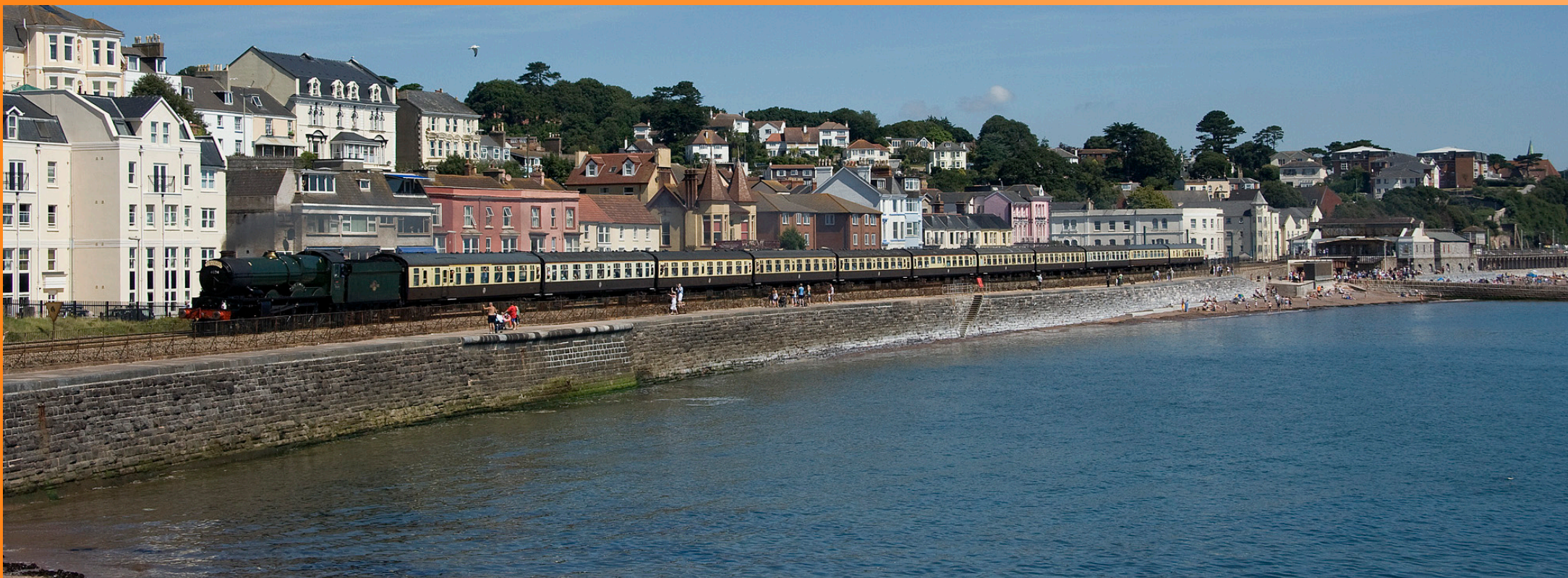
Above: Sunday 27th July and 6024 heads along Marine parade with the down Torbay express. This shot taken from boat cove on another glorious summer day.