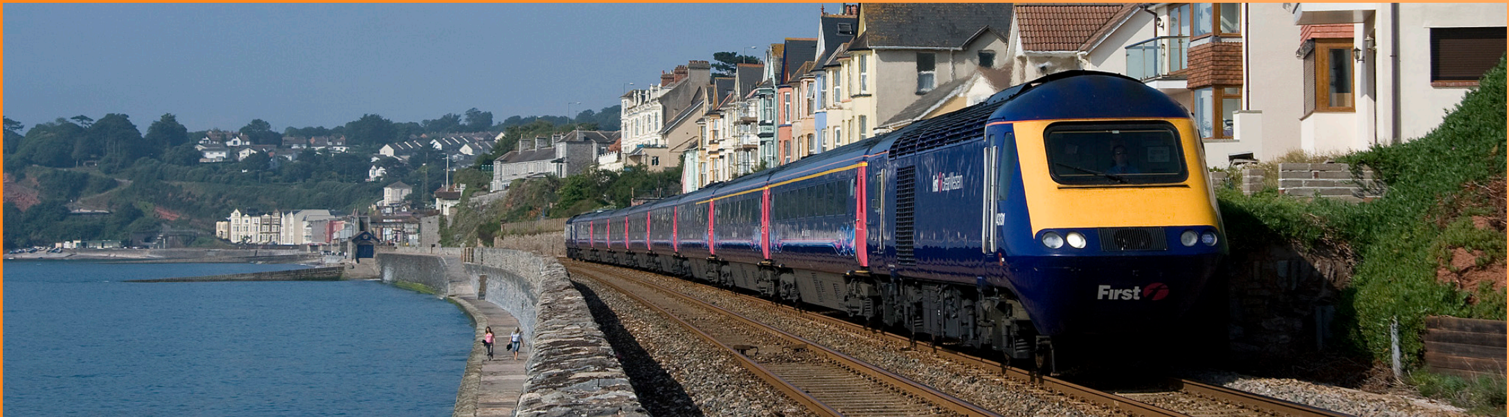
Above: 43057 leads 43239 past Rockstone Bridge with the Manchester Picadilly to Newquay on 26th July. Below: 43131 and 43145 head along the wall towards Dawlish Warren on 23rd July with the 0640 Penzance to Paddington.