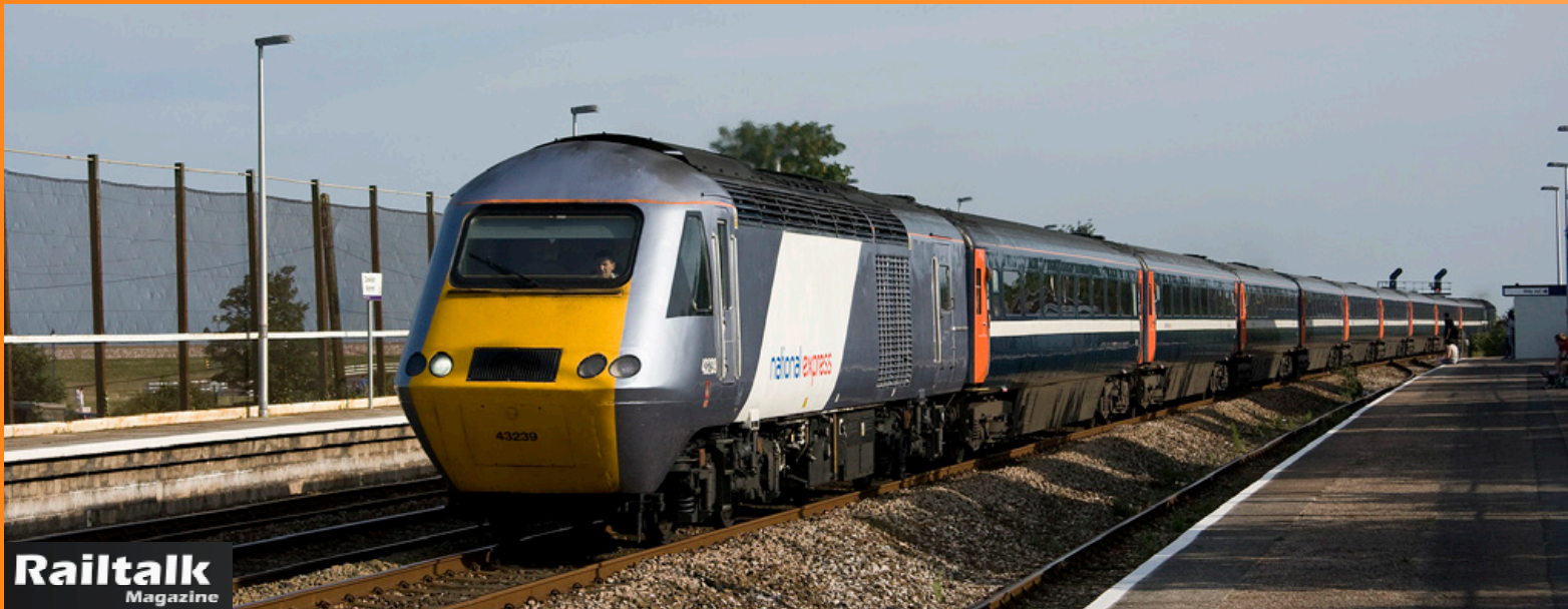
Left: 43239 leads the 1522 Newquay to Manchester Piccadilly through Dawlish Warren on Saturday 26th July