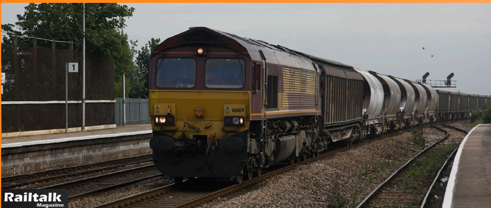
Left: Class 66 169 passes Dawlish Warren with 6B99 Tavistock - Alexander Dock Jct. on 24th July.