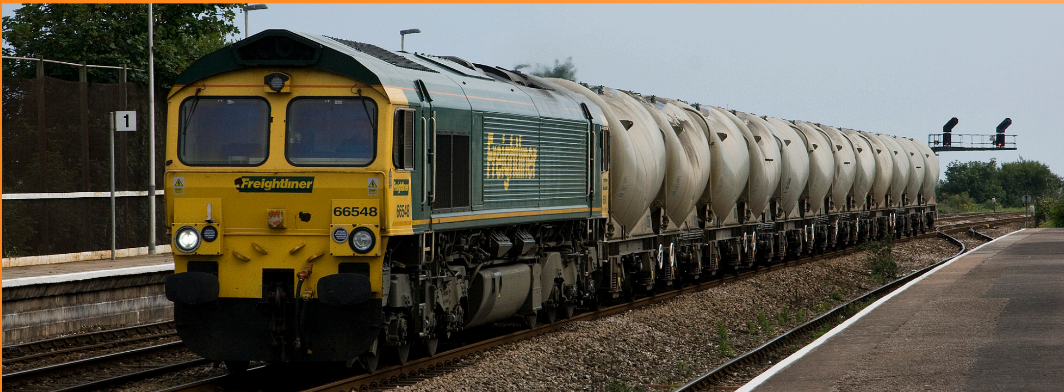
Above: Class 66 548 hauls the Moorswater to Westbury cement up through Dawlish Warren on 22nd July.