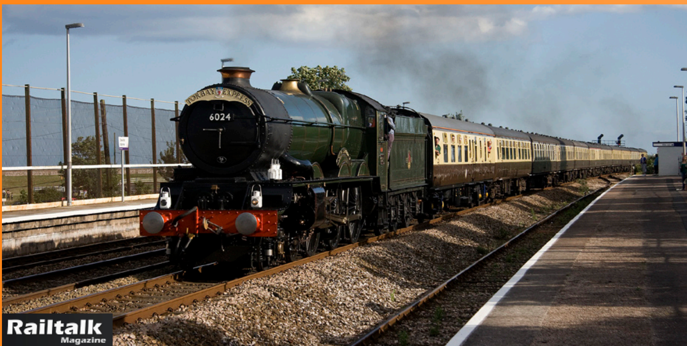
Left: The returning Torbay Express thunders through the middle road at Dawlish Warren a week earlier, on 20th July. The 2008 season saw train blessed with a matching rake of chocolate and cream stock.