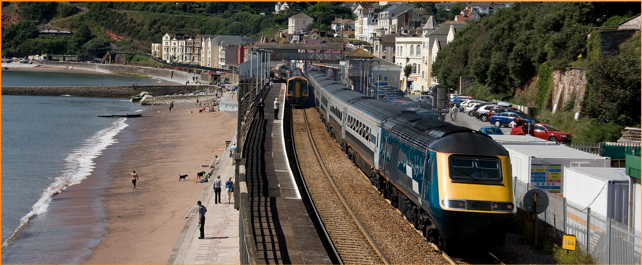
Above: 43166 storms through the platform at Dawlish on 20th July with XC's 1025 Plymouth to Dundee service.