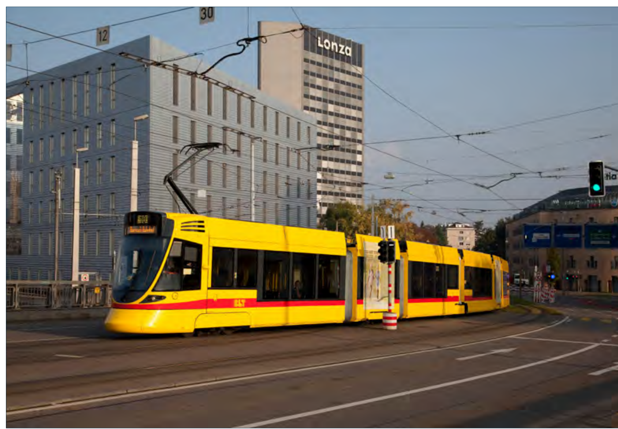
▶ Basel BLT tram No. 189 heads along Munchensteinstrasse working a line No. 10 service to Dornach Bahnhof. Paul Godding