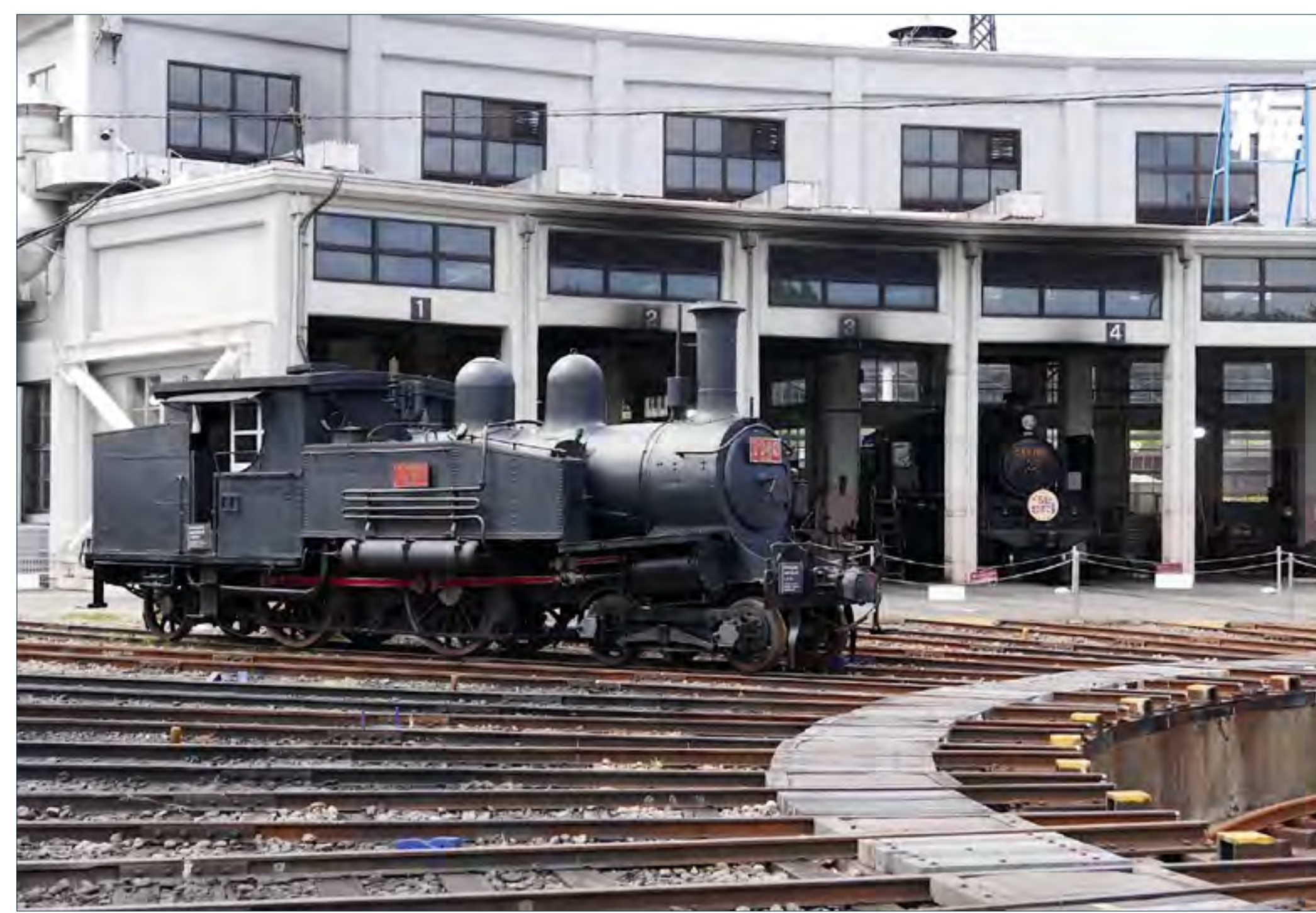
▶ JR 4-4-2 steam loco No. 1080 is seen at Kyoto Railway Museum on September 14th. This loco was built in Glasgow by Dubs & Co in 1901. Keith Chapman