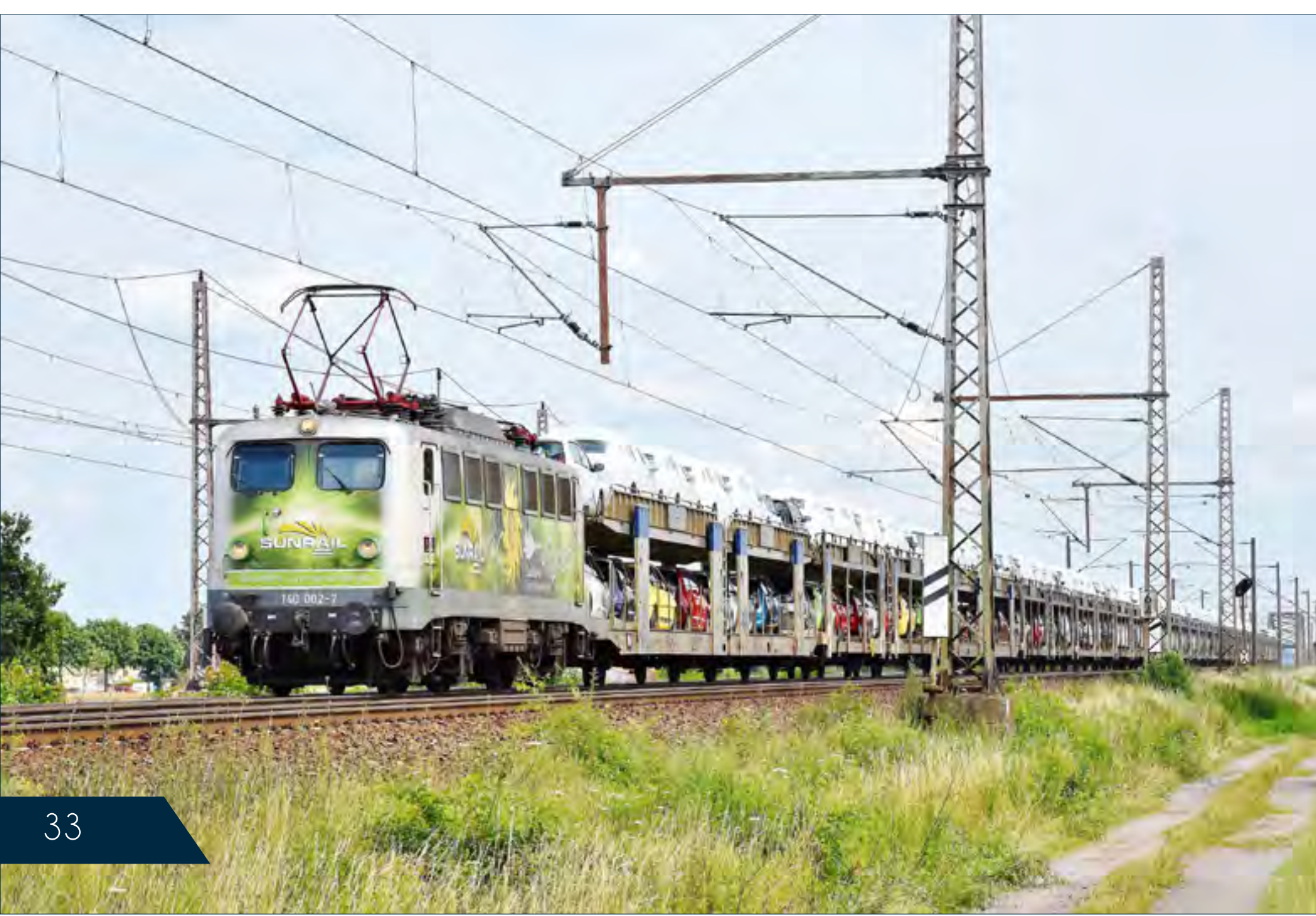
▶ A superb livery on Sunrail's Class 140.002 as it heads a westbound loaded car train near Dedensen-Gümmer. John Sloane