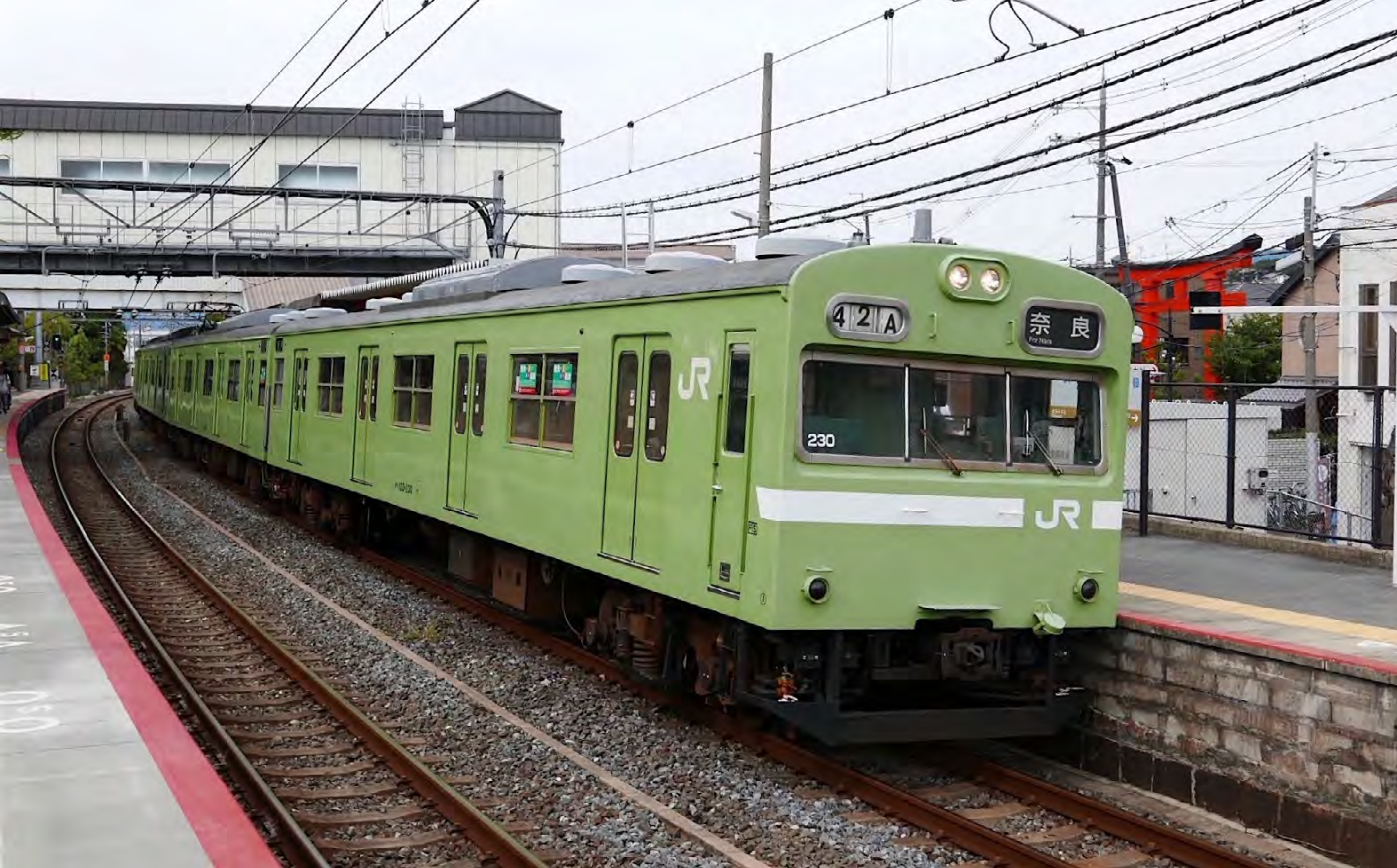
▶ A JR West 103 Series EMU stands at Inari station, working a Kyoto area service, on September 15th. Keith Chapman