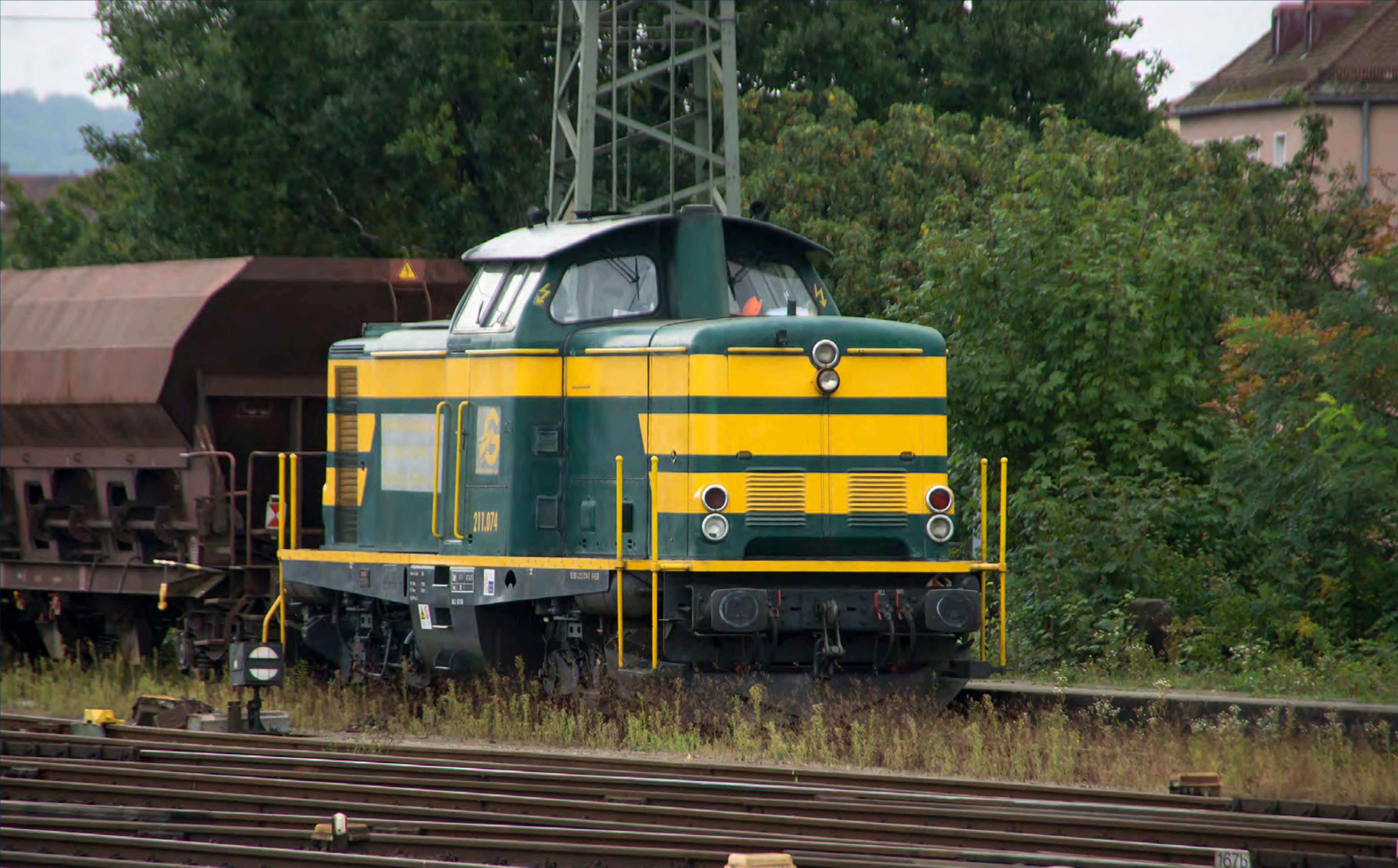
▶ Built in 1962 this former DB operated V100 is now in use with Erfurter Gleisbau GmbH, Erfurt and numbered 211.074, seen here at Nuremberg. Brian Battersby