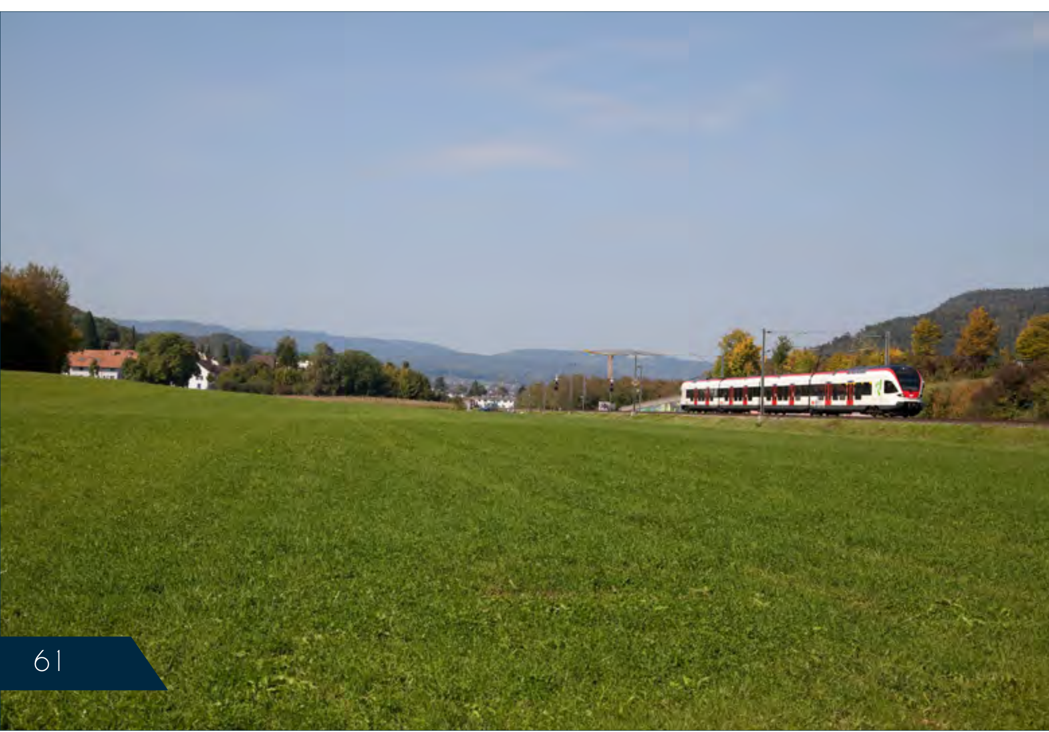
▶ SBB Class 521.016 passes Itingen working a S3 service to Olten. Paul Godding