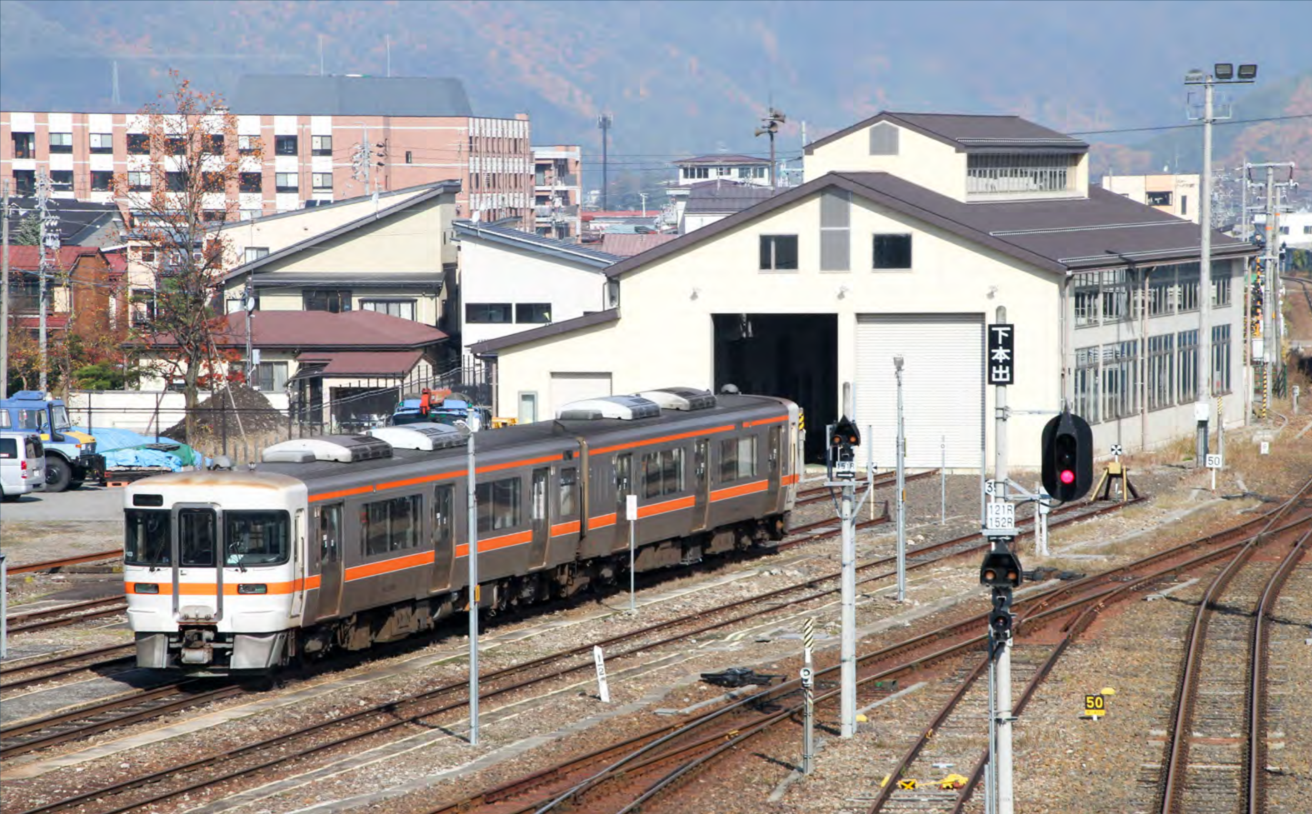
▶ A 2 car DMU stands outside Takayama depot on November 10th. Mark Enderby