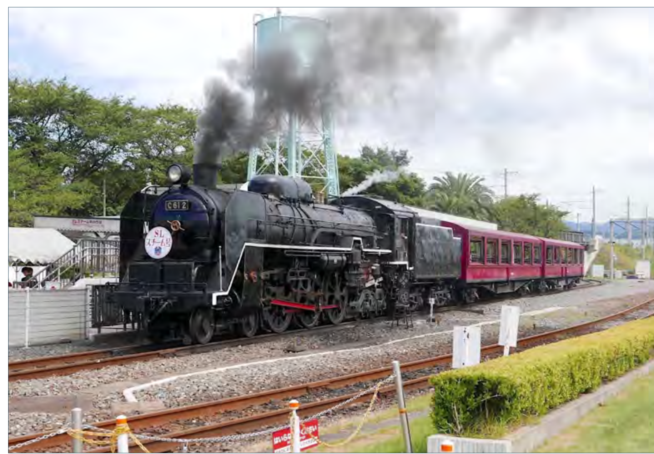
▶ JR 4-6-4 steam loco No. C612 is seen working at Kyoto Railway Museum on September 14th. This class of Japan's largest passenger steam locos, were built in 1948 by Hitachi.