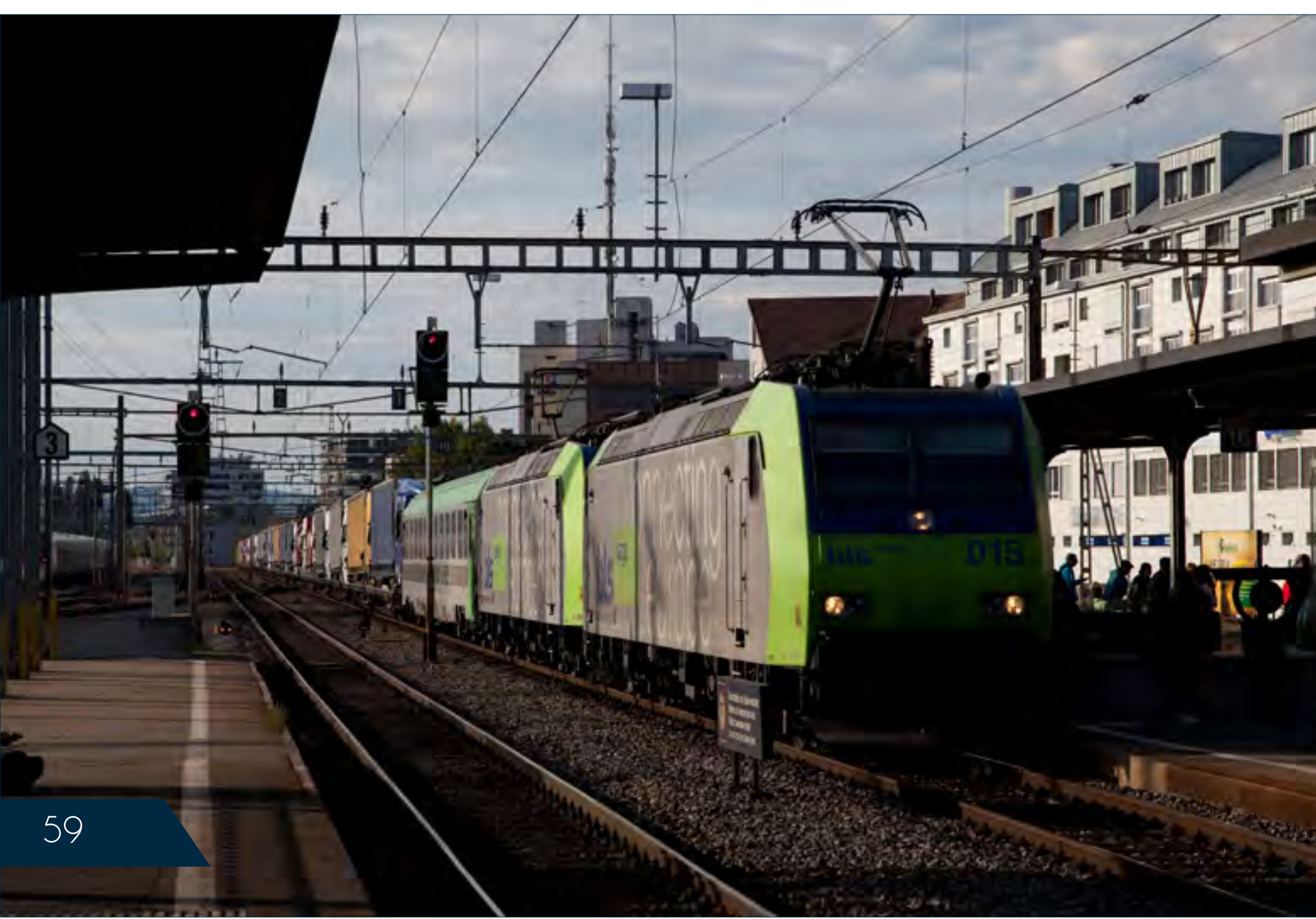
▶ BLS Class 485 015 leads another Class 485 through Thun with an intermodal service. Paul Godding