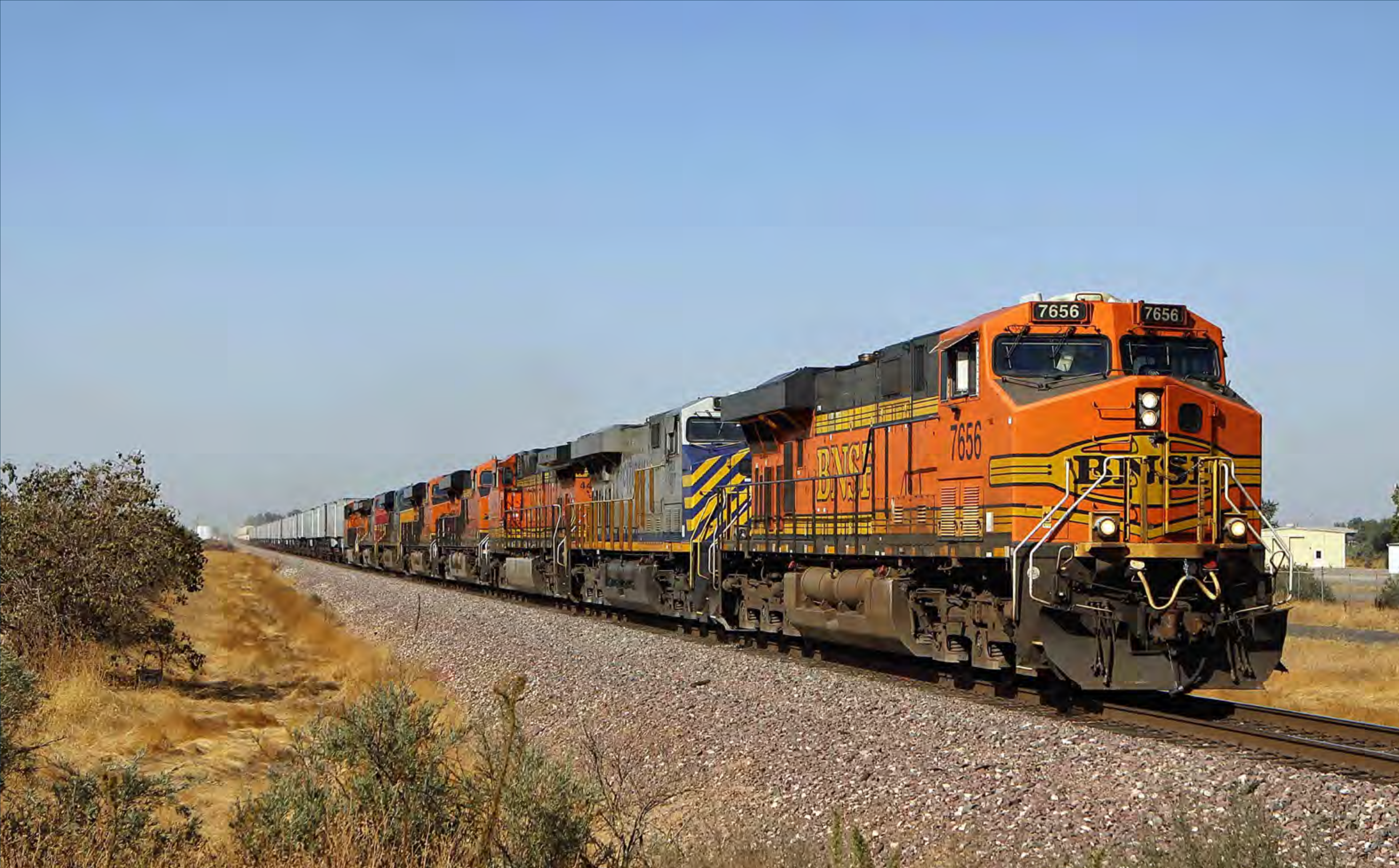
▶ BNSF No. 7656 (GE ES44DC) leads 7 other locos through Modesto with trailers and double stack containers heading south on October 9th. Nick Clemson