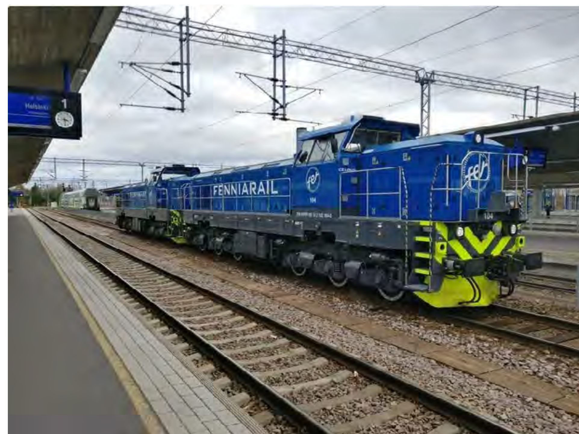
Photo: EffiShunter 1600 (Finnish designation Dr18.104) upon arrival at Kouvola Station. ©CZ LOKO

Prague Tatra T3SU tram No. 7122 approaches the stop at Brusnice whilst working a line 23 service. Stearnsounds