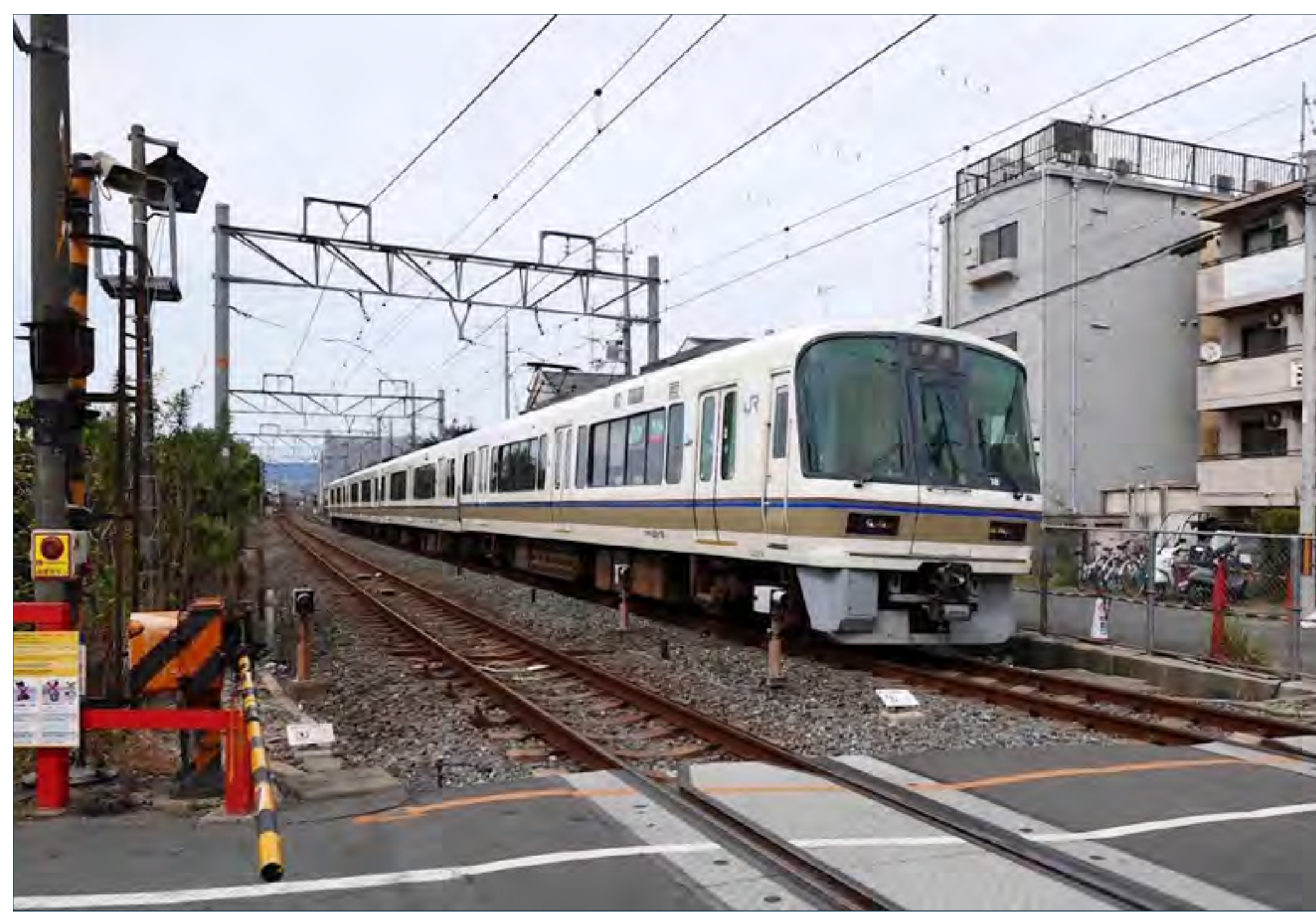
▶ A JR West 221 Series EMU passes Inari, working a Kyoto area service, on September 15th.