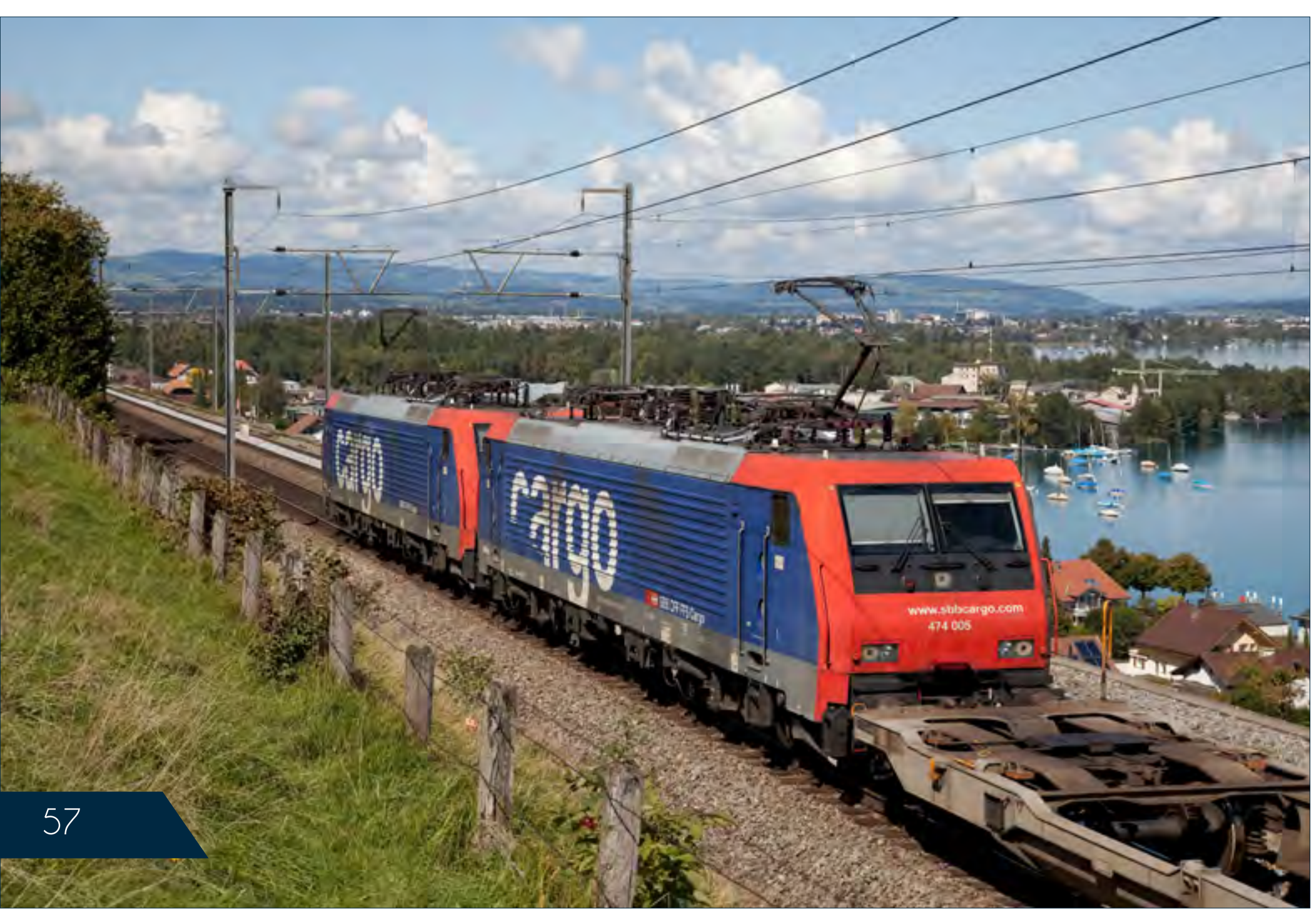
▶ A pair of SBB Cargo's Class 474s haul a container train through Speiz Ghei.