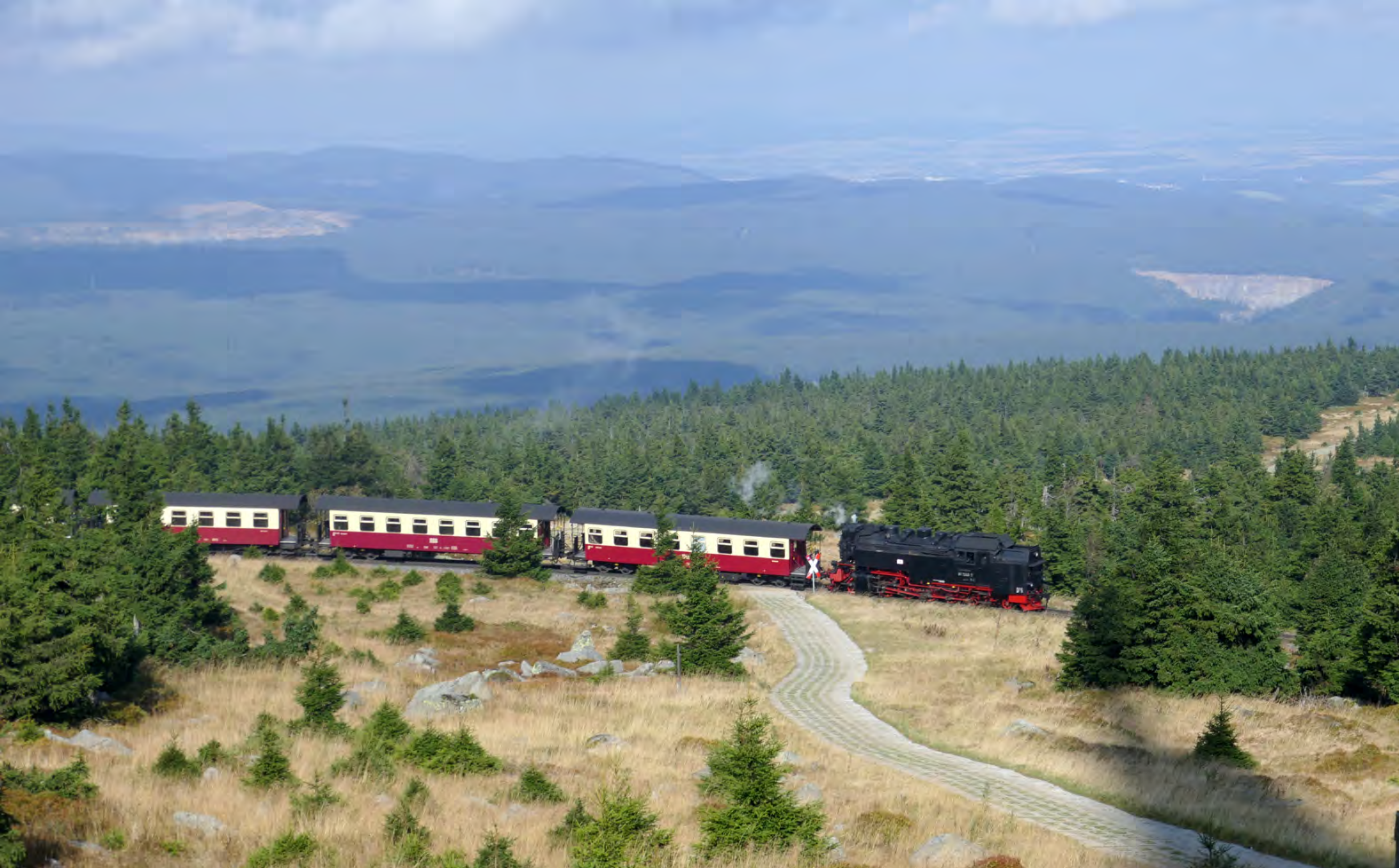
▶ HSB Dampflok No. 99.7240 is seen descending from the Brocken. Steamsounds