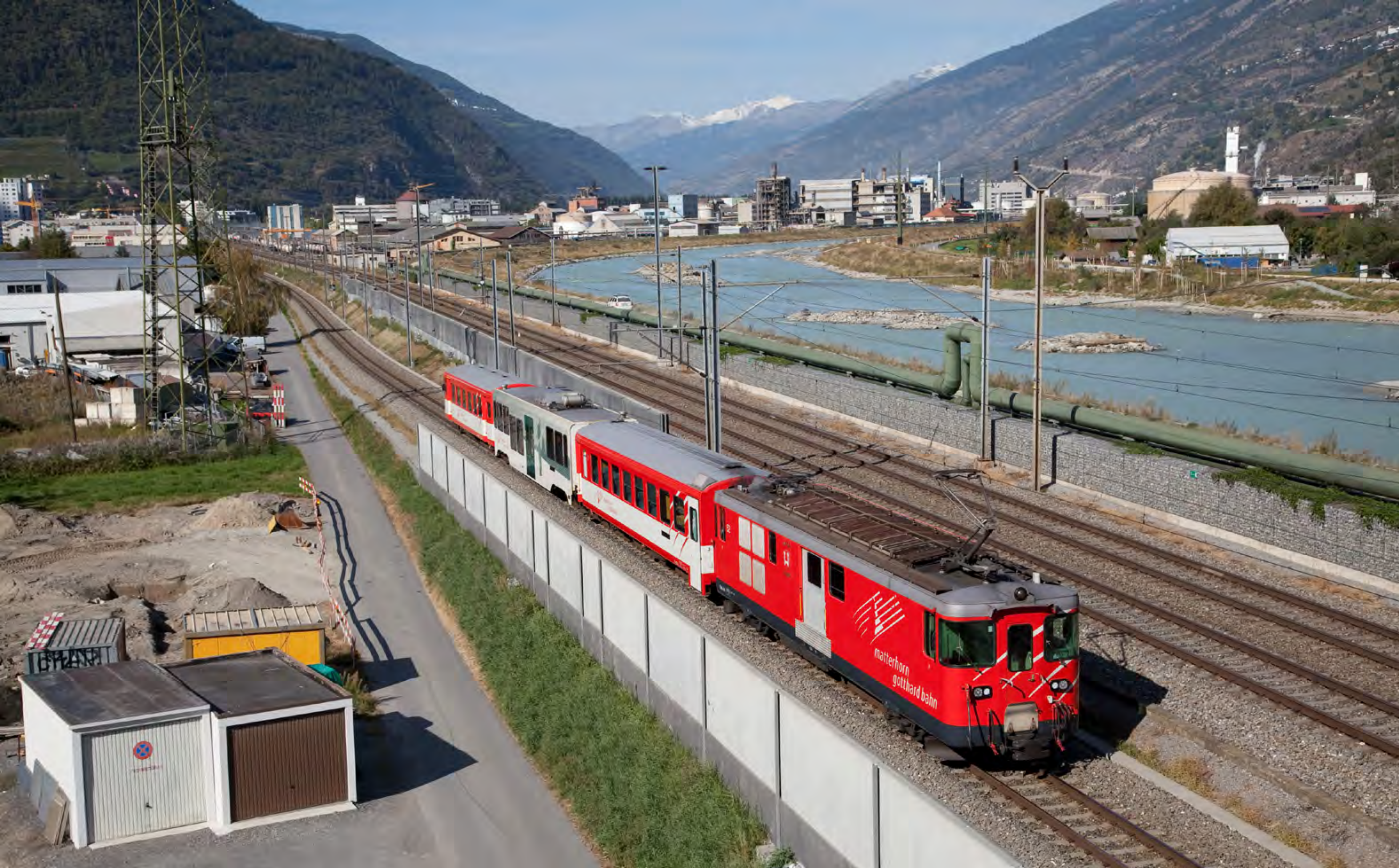
▶ Matterhorn Gotthard Bahn No. 52 approaches Lalden with a service to Brig.