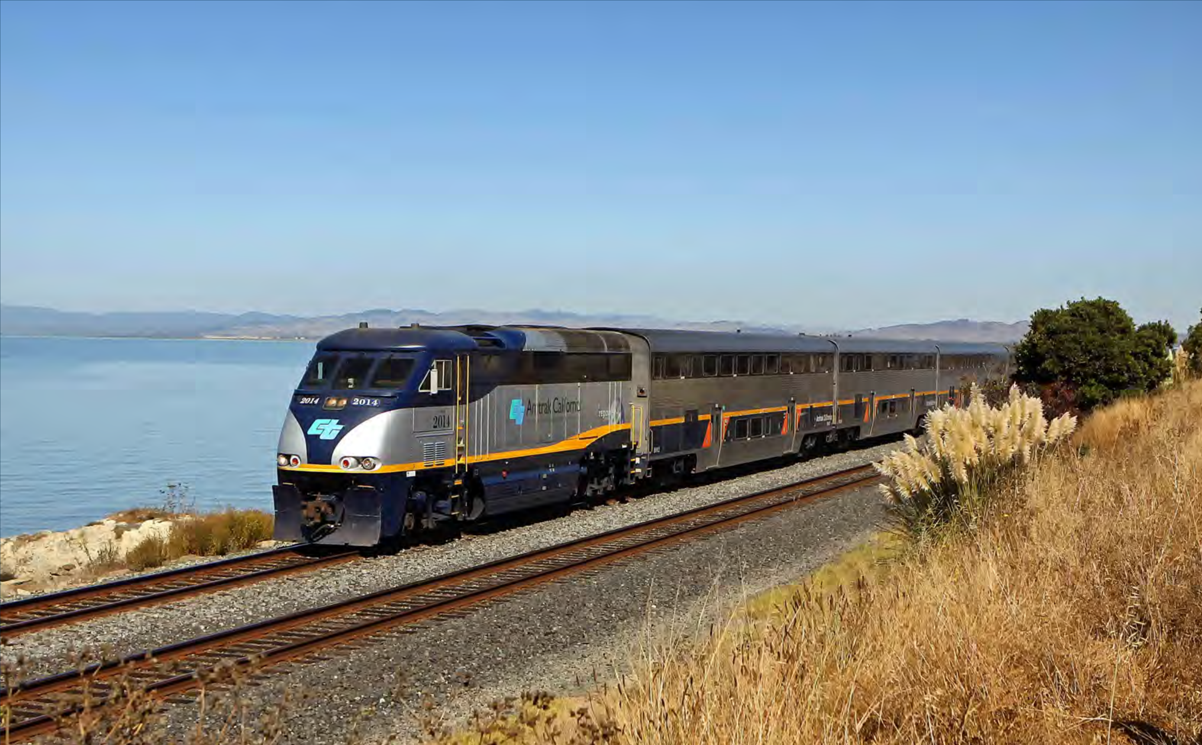
GM EMD F59PHI Amtrak California No. 2014 working train No. 713 08:00 Bakersfield - Oakland, passes Pinole Shores Park at Gateley, California on October 4th.