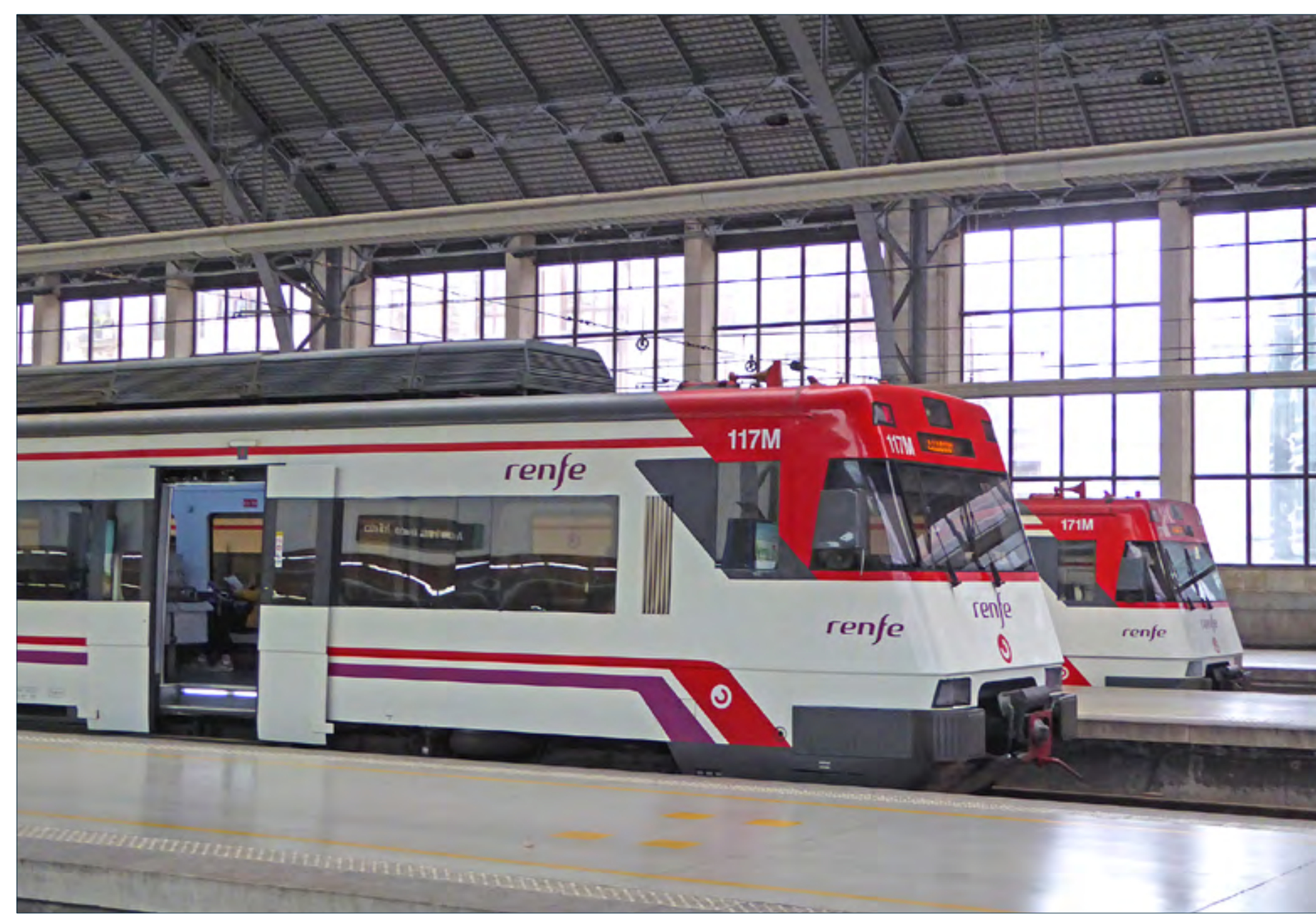
Renfe Class 446 EMU No. 117M has just arrived at RENFE station Bilbao with a service from Llodio on May 9th.