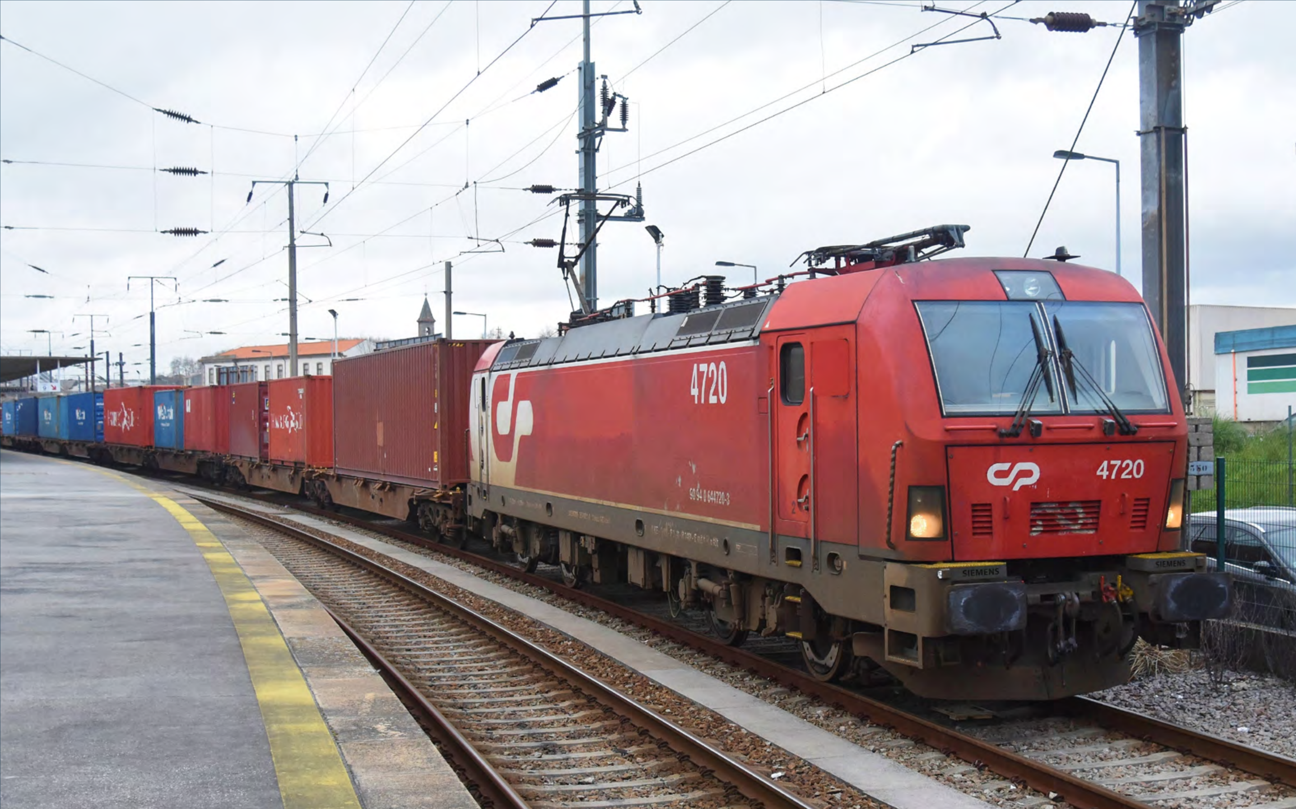
CP Eurosprinter No. 4720 is seen at Porto Campanha with a southbound container train from Leixoes on March 29th.