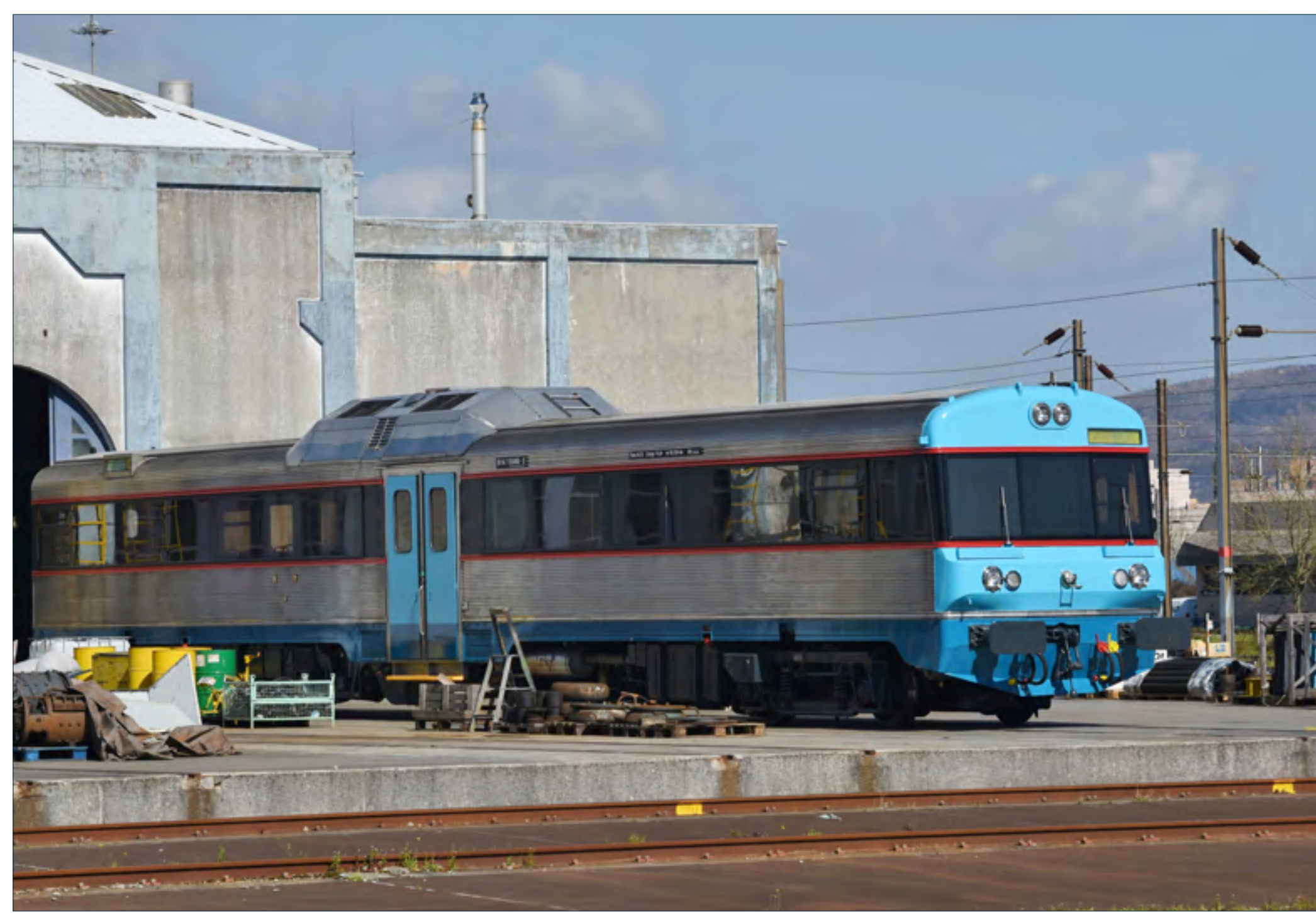
Rebuilt Allan railcar No. 0367 is seen in store at Contumil.