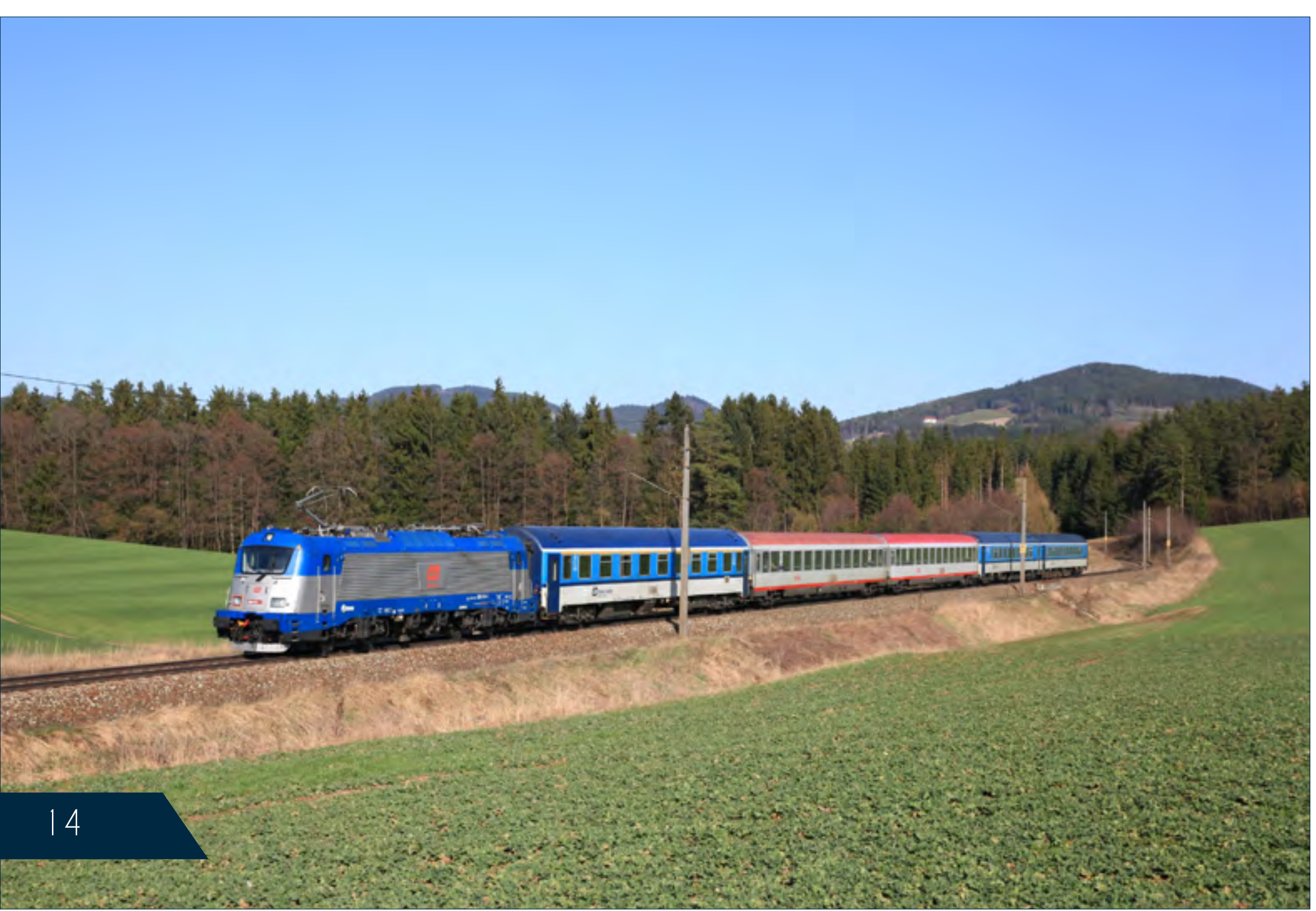
▶ On April 8th, Class 380.014 hauls train No. Rex1544 past Lasberg/St. Oswald.