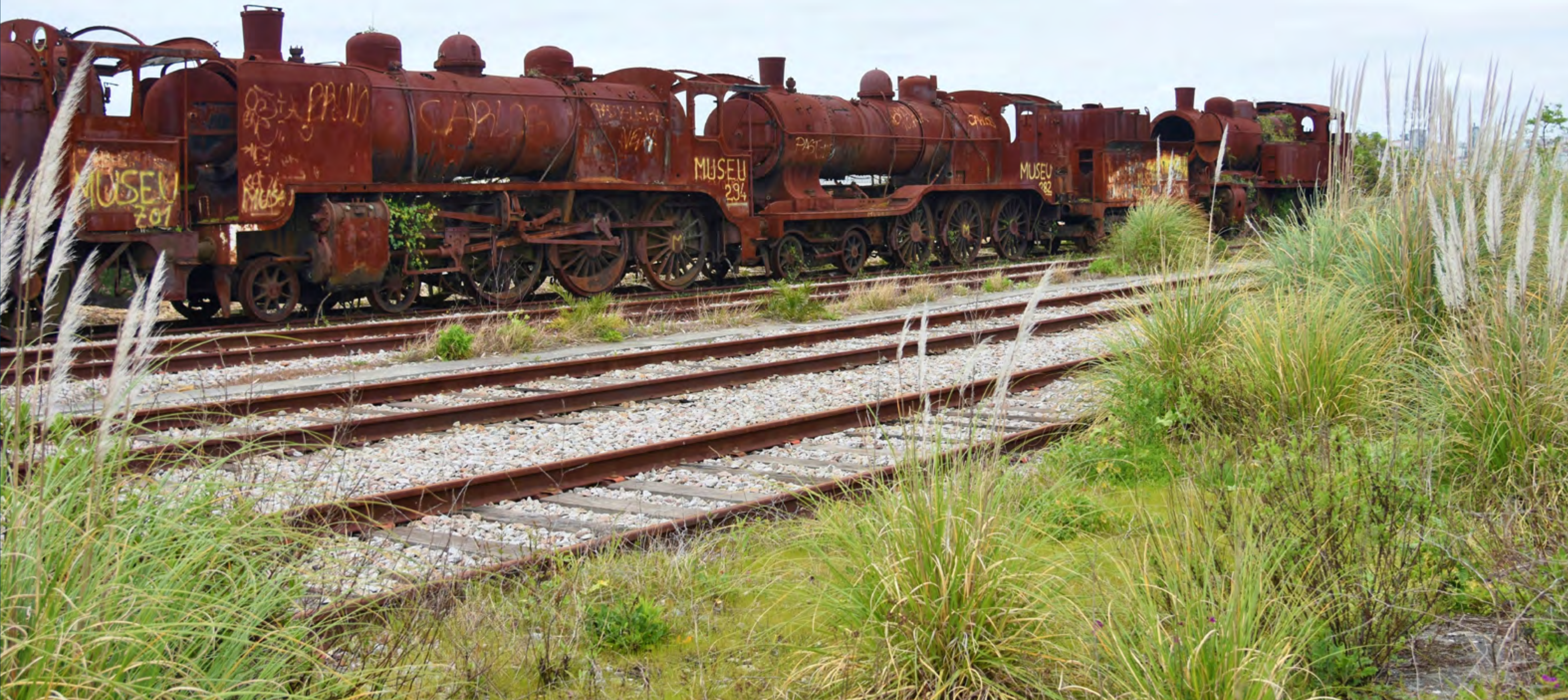
Derelict 4-6-0's Nos. 294 and 282 along with 2-6-4T No. 072 continue their long wait for restoration in Vila Nova de Gaia Yard.