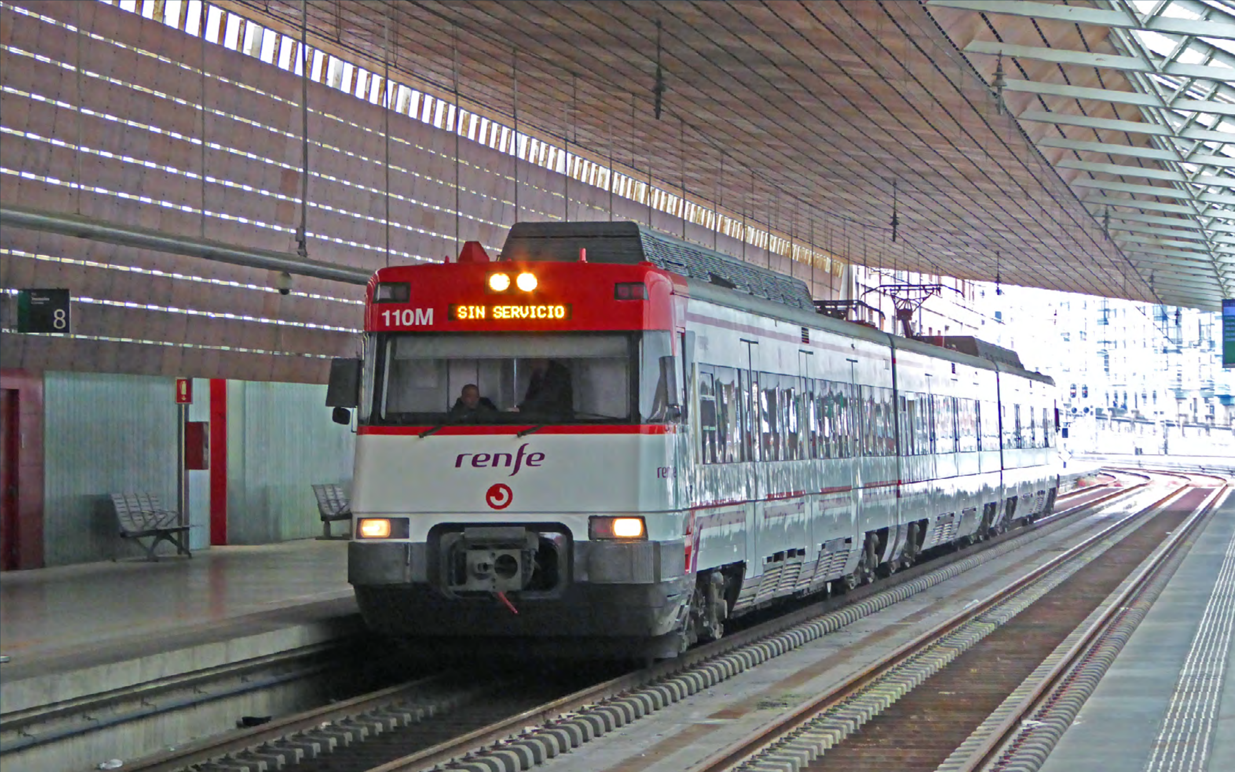
On May 9th, Renfe Class 446 EMU No. 110M arrives as empty stock into Bilbao station.