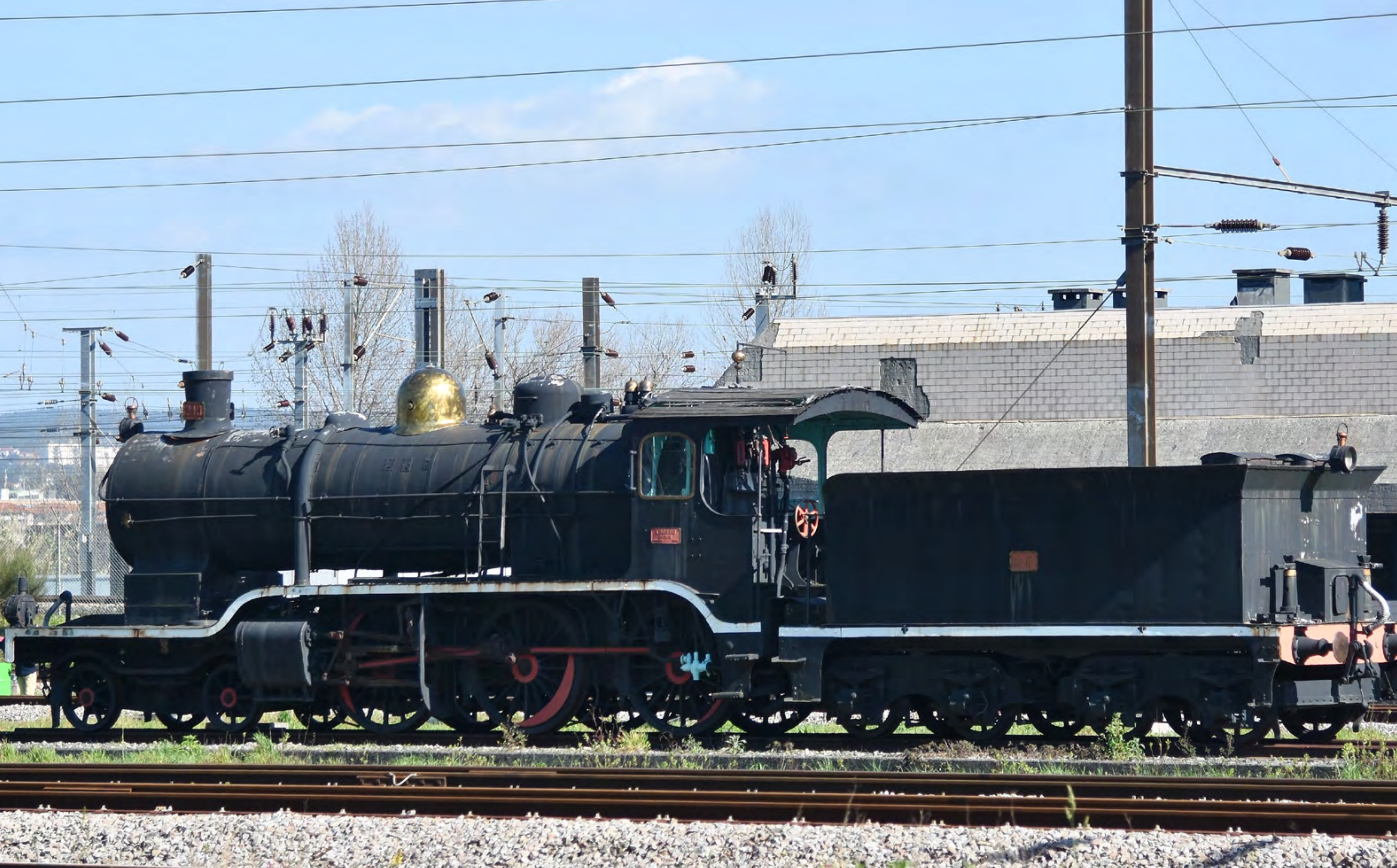
CP four cylinder Borsig built 4-6-0 No. 248 stands plinthed in Contumil depot on March 26th. John Sloane