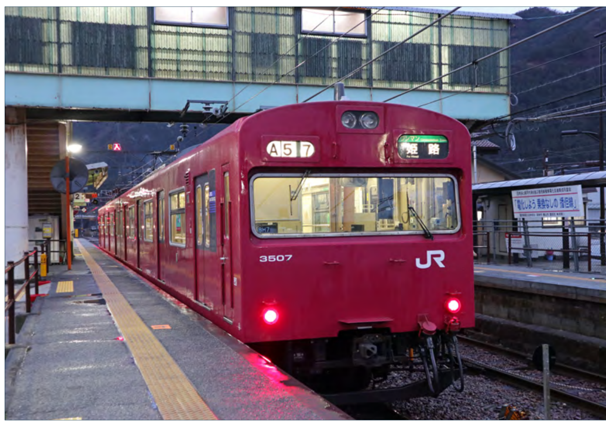
Waiting departure from Teramae on March 8th with service A57 the 18:06 to Himeji is Banton Line 2-car series 103 1500V DC 2-car EMU set BH7 formed of (DMSO) KuMoHa No. 103-3507 and (DMSOL) KuMoHa No. 102-3507 (nearest at rear). David Pollock