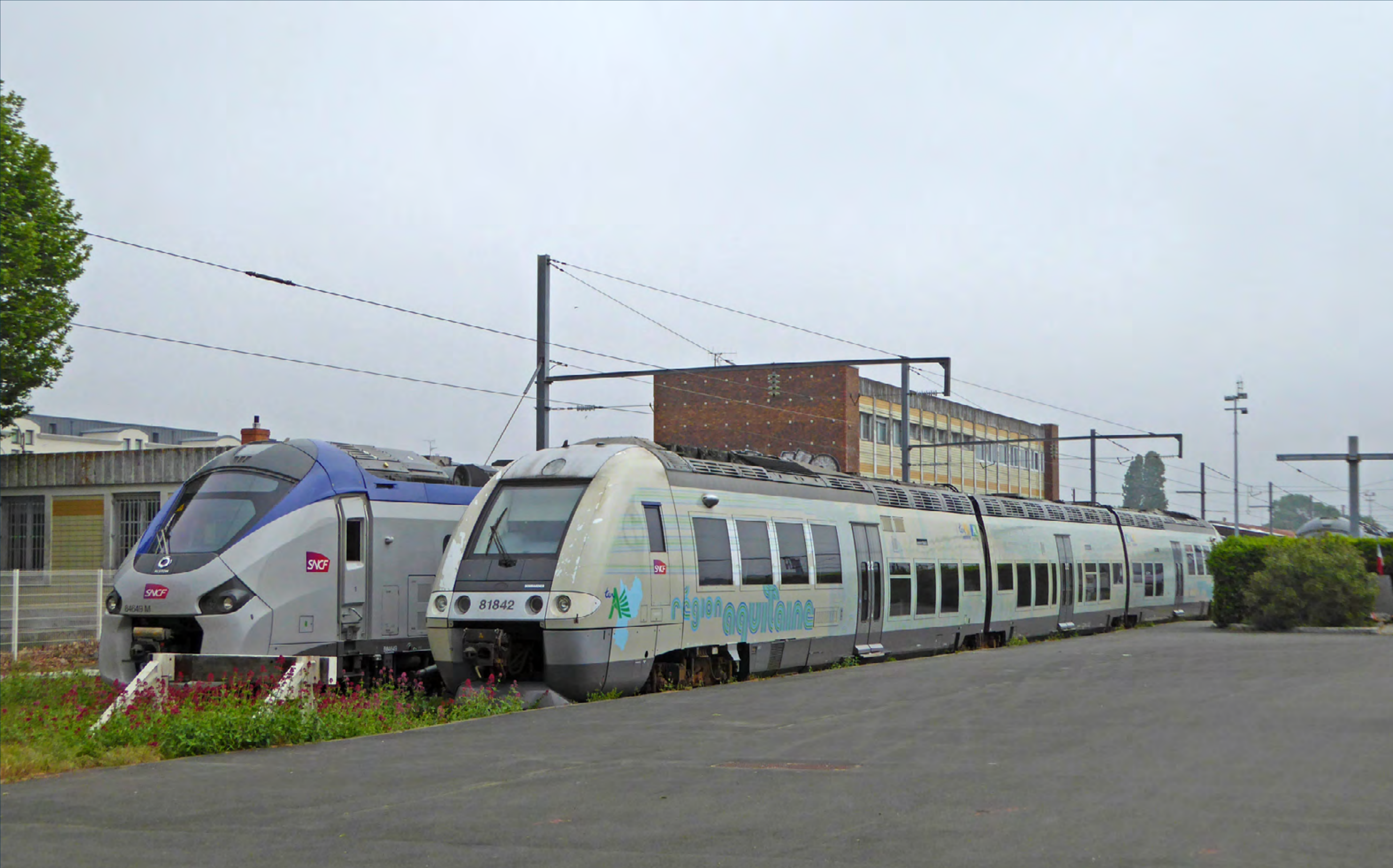
On May 8th, SNCF 'Region Aquitaine' EMUs Nos. 81842 and 84649 are seen stabled at La Rochelle station.