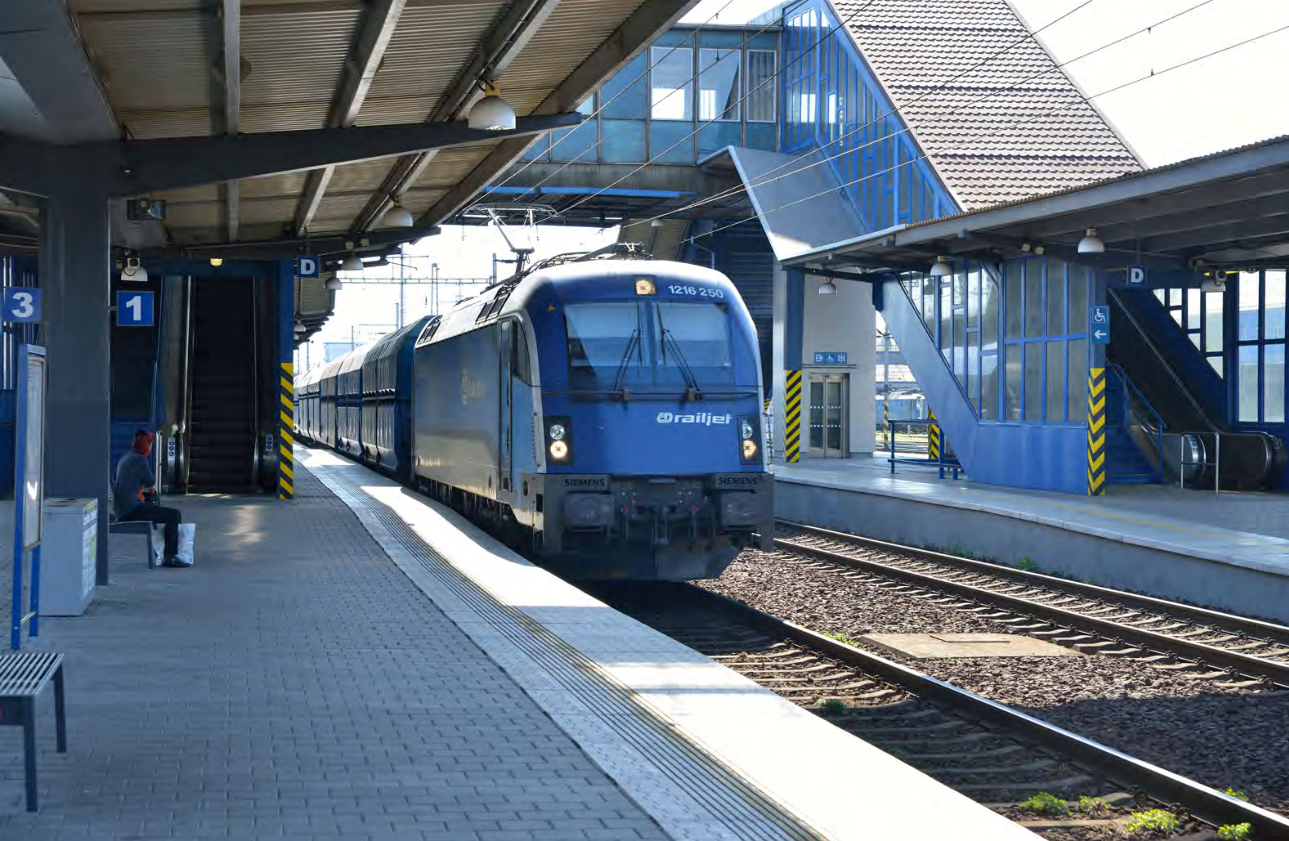
▶ CD Railjet liveried Class 1216.250 speeds through Ostrava hl.n. on April 21st at the head of a rake of PKP coal hoppers. Class47