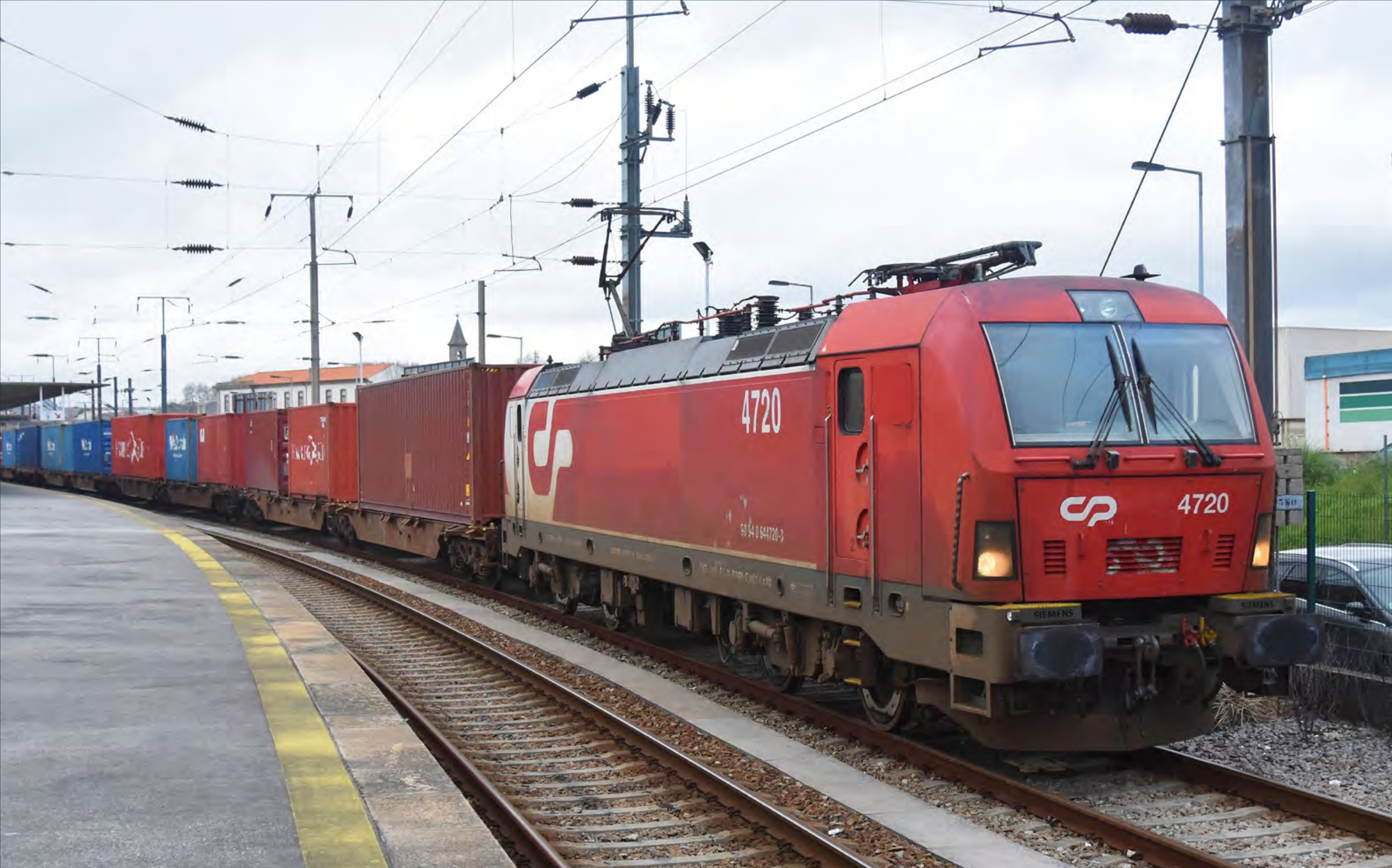
CP Eurosprinter No. 4720 is seen at Porto Campanha with a southbound container train from Leixoes on March 29th.