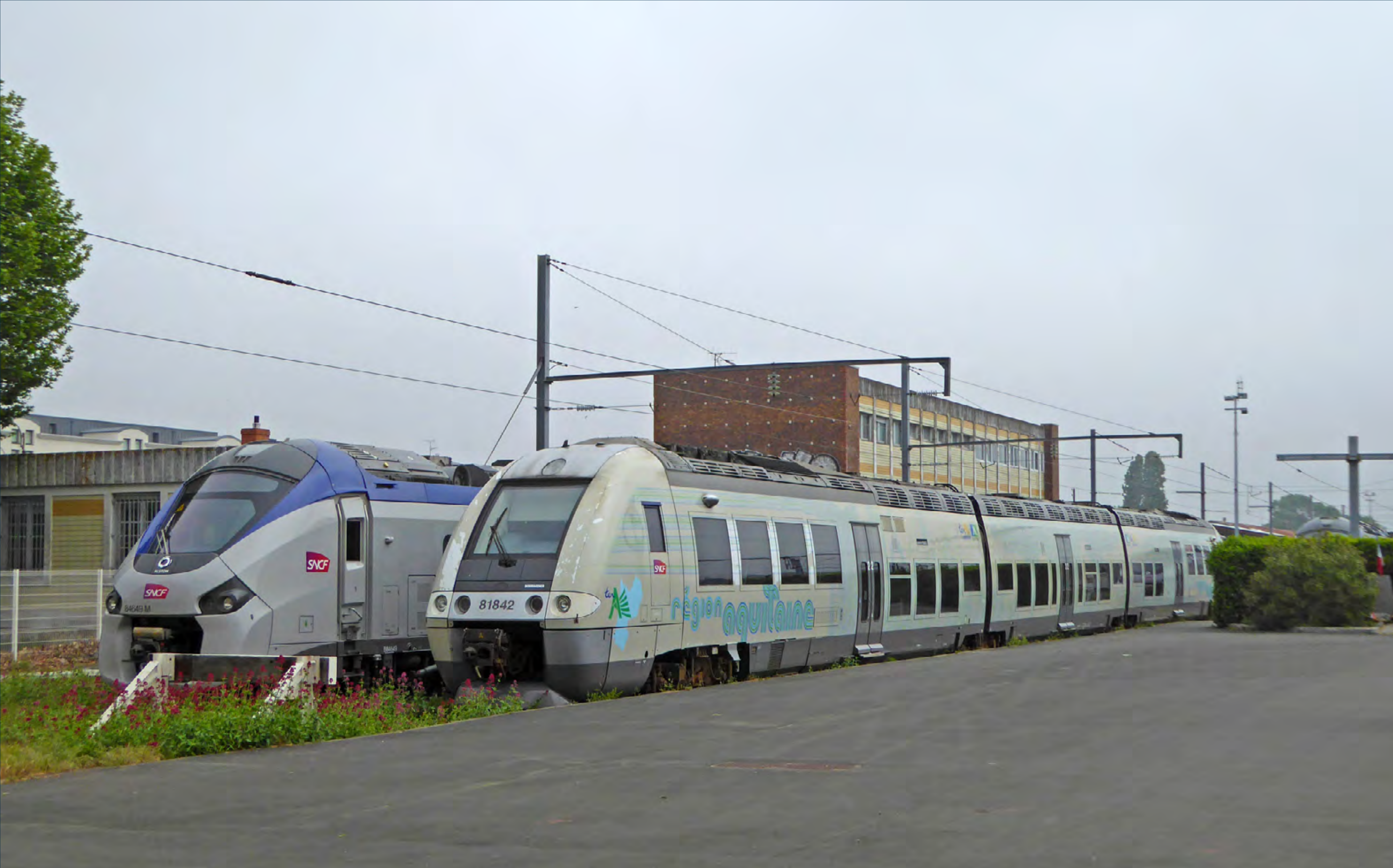
On May 8th, SNCF 'Region Aquitaine' EMUs Nos. 81842 and 84649 are seen stabled at La Rochelle station.