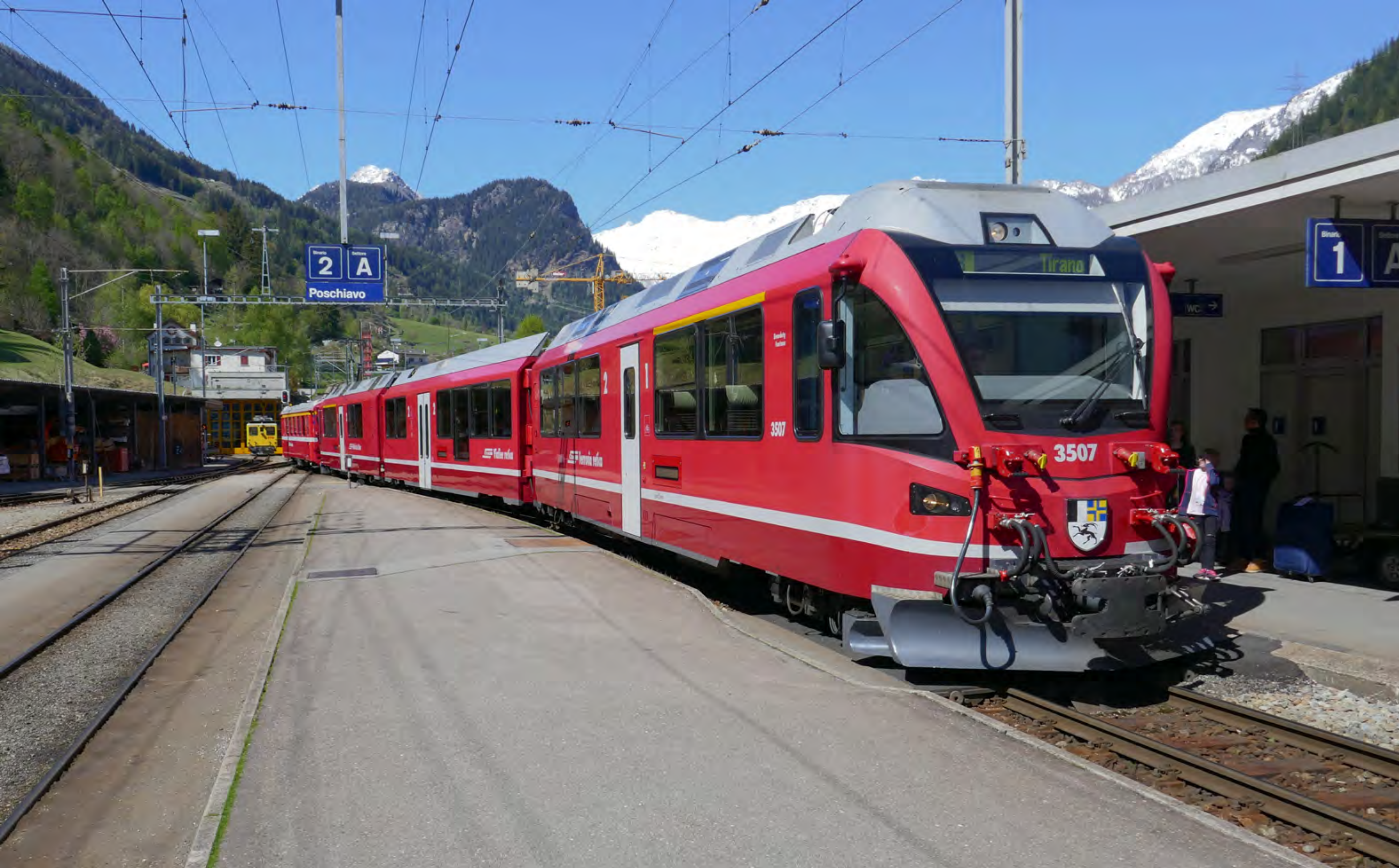
RhB Allegra EMU No. 3507 arrives at Poschiavo station with train No. R1637 from St. Moritz to Tirano. Steamsounds