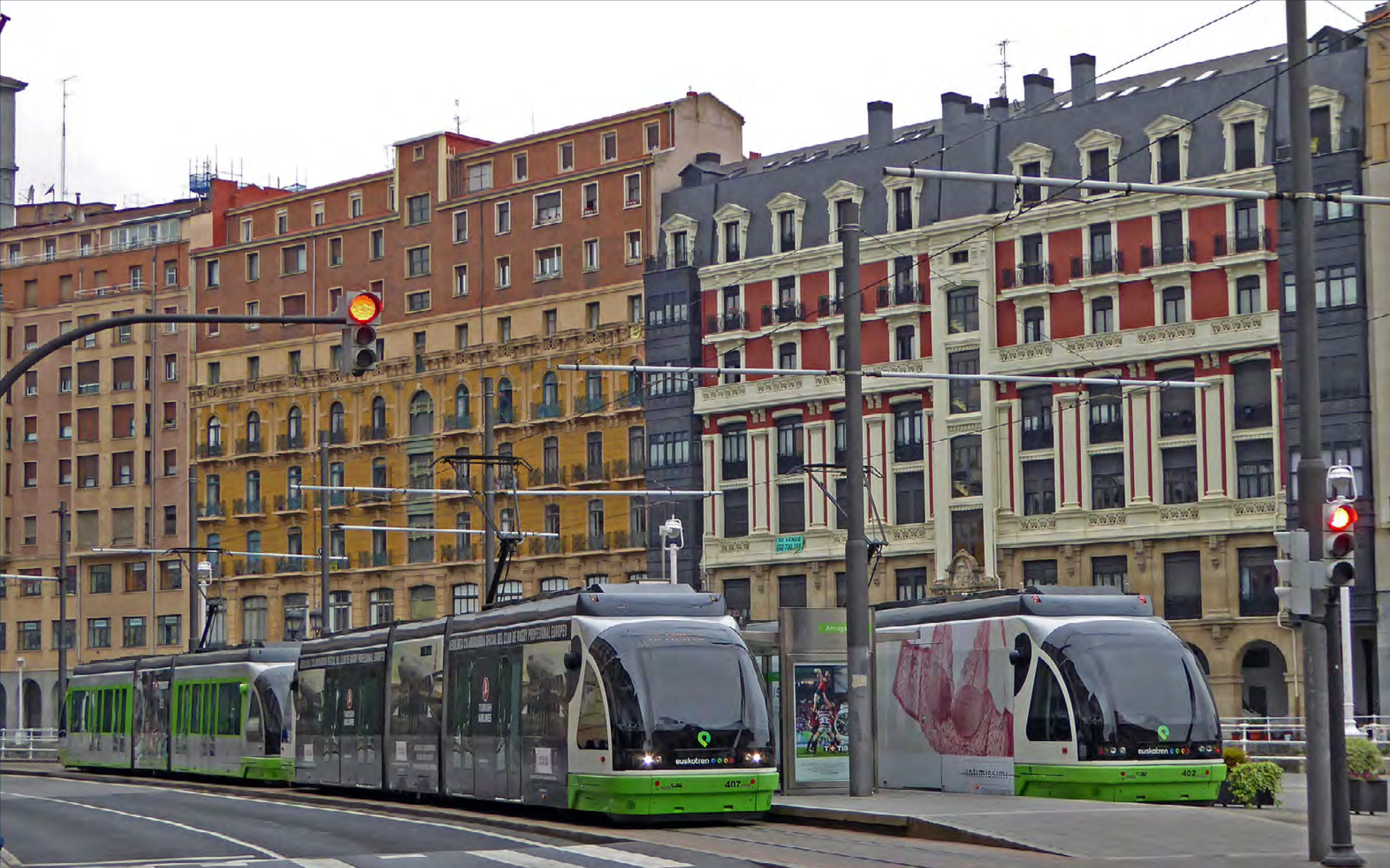
CAF trams Nos. 402 and 407 at Bilbao's Arriaga stop waiting for access to the single line tracks in both directions. Michael Lynam