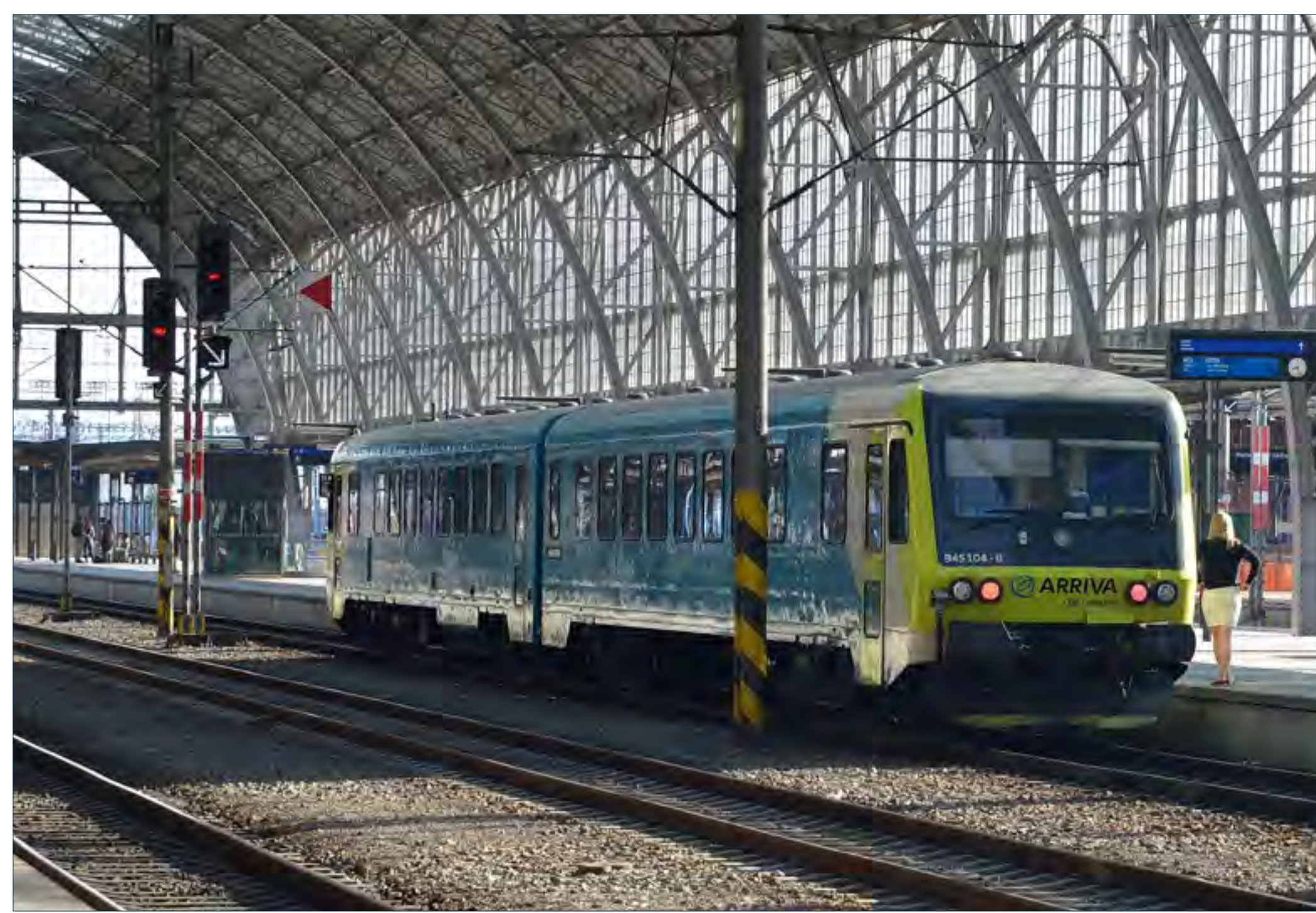
▶ CD City Elefant No. 471.081/971.081 calls at Ostrava hl.n. on April 21st working a service to Studenka. Class47