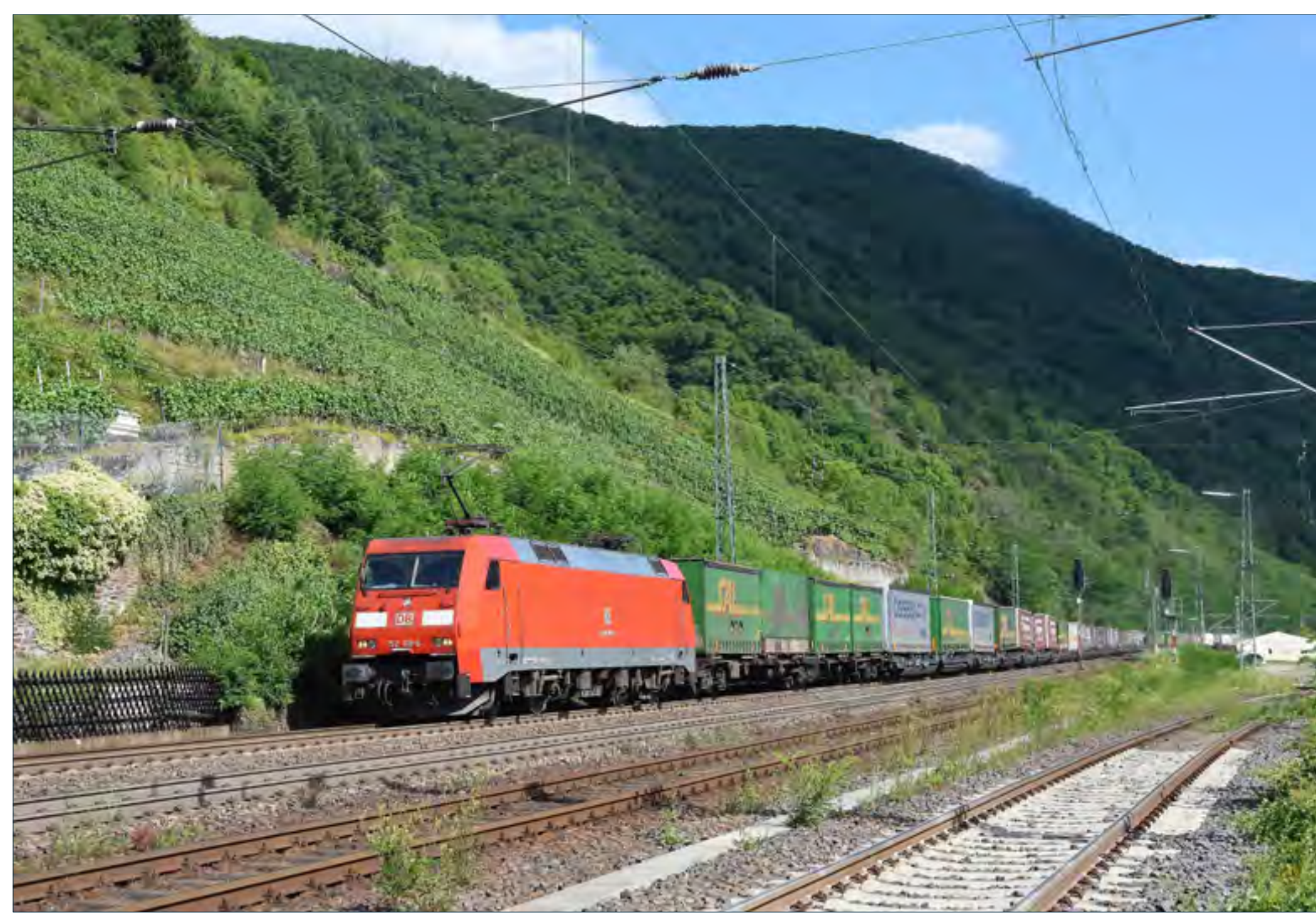
▶ SNCB TRAXX No. 2837 (Class E186 229) leads a tank train north out of Gremberg yard. John Sloane