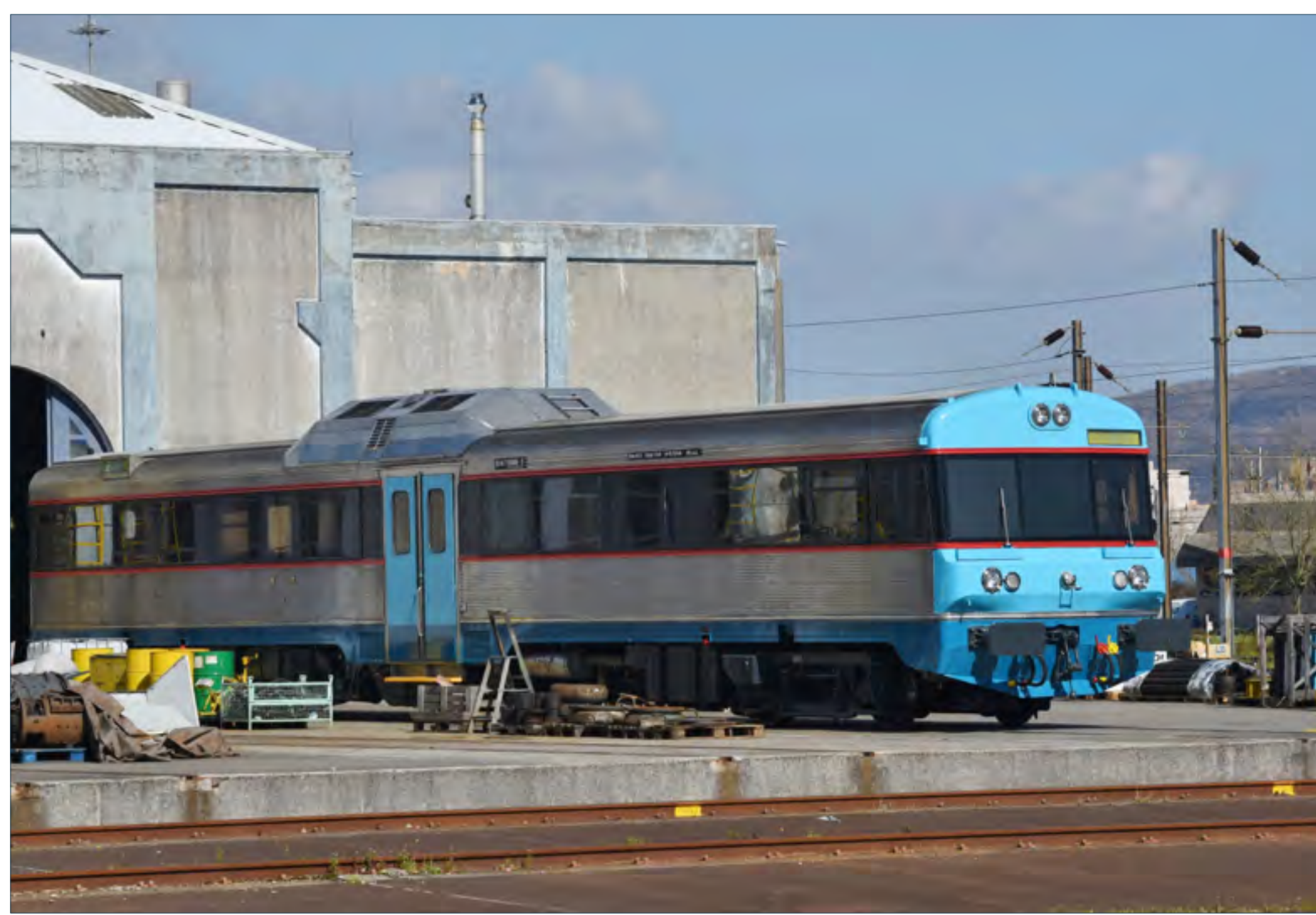
Rebuilt Allan railcar No. 0367 is seen in store at Contumil.