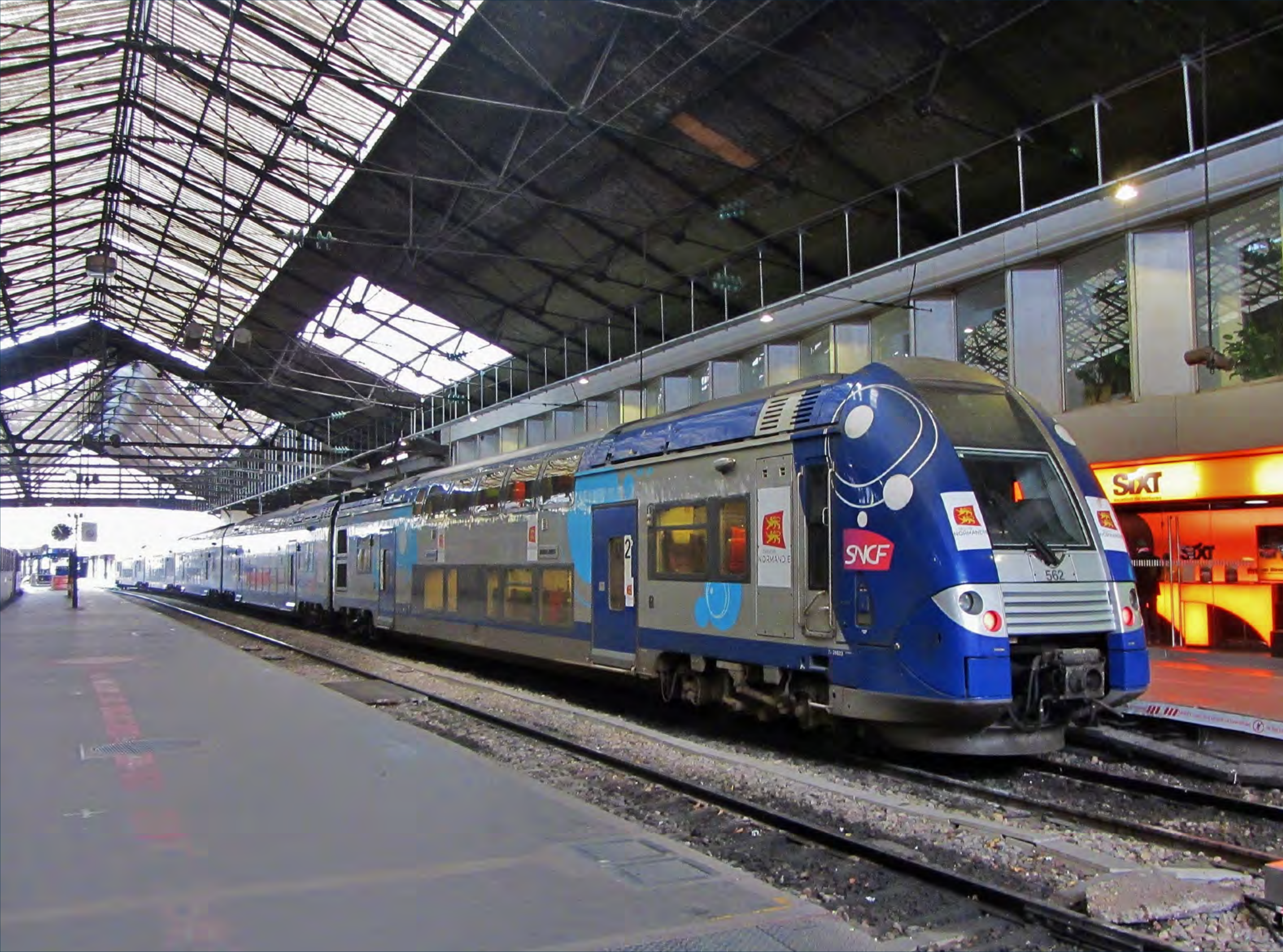
SNCF 'Region Normandie' Class 26500 unit No. 562 stands at Paris St. Lazare.