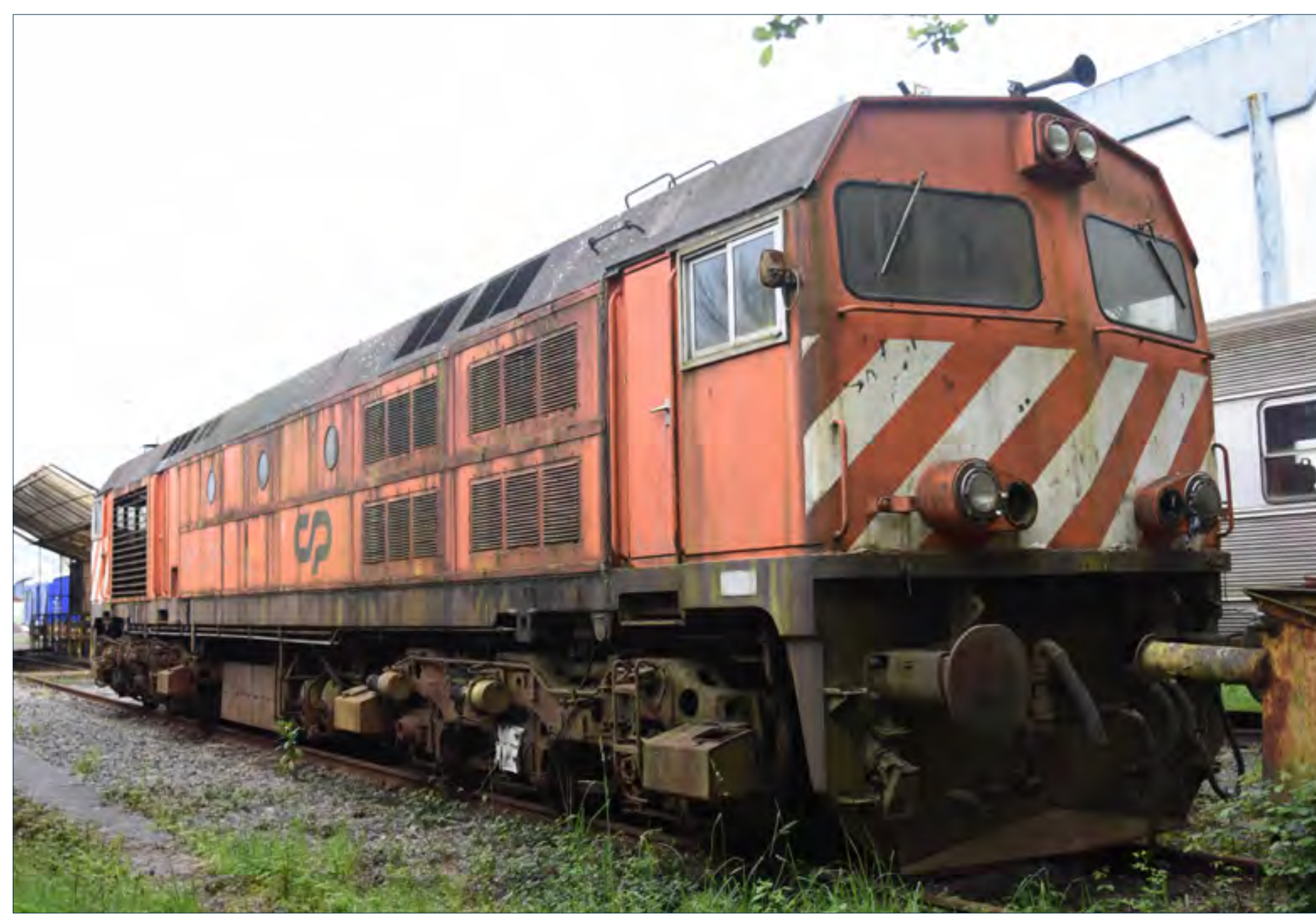
Refurbished Alfa Pendular No. 4009 stands at Guimaraes with a through train to Lisbon on March 29th. This used to be a small metre gauge station on the line to Fafe, however the line from Lousado has now been converted and Guimaraes is now a substantial terminus. John Sloane