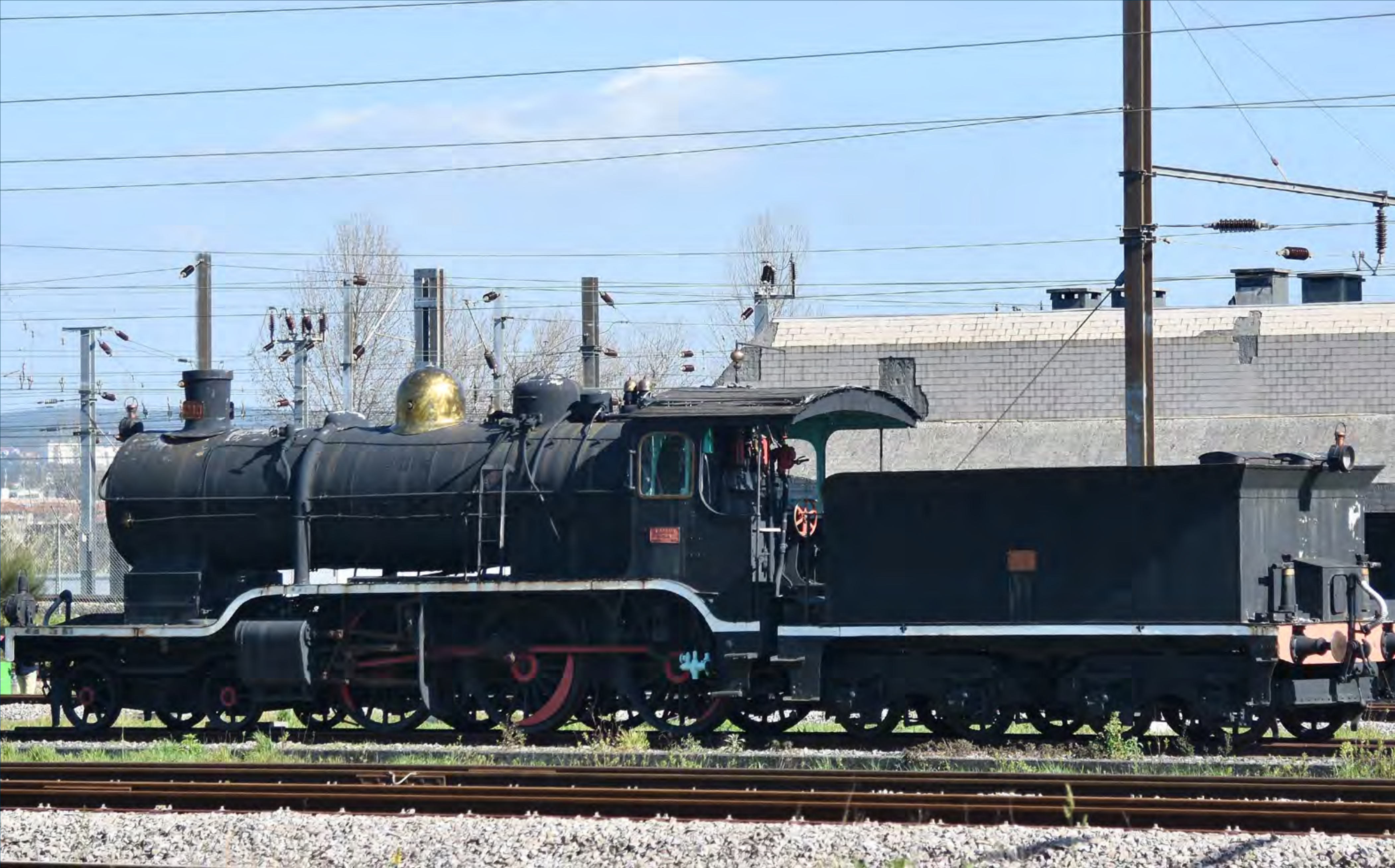
CP four cylinder Borsig built 4-6-0 No. 248 stands plinthed in Contumil depot on March 26th. John Sloane