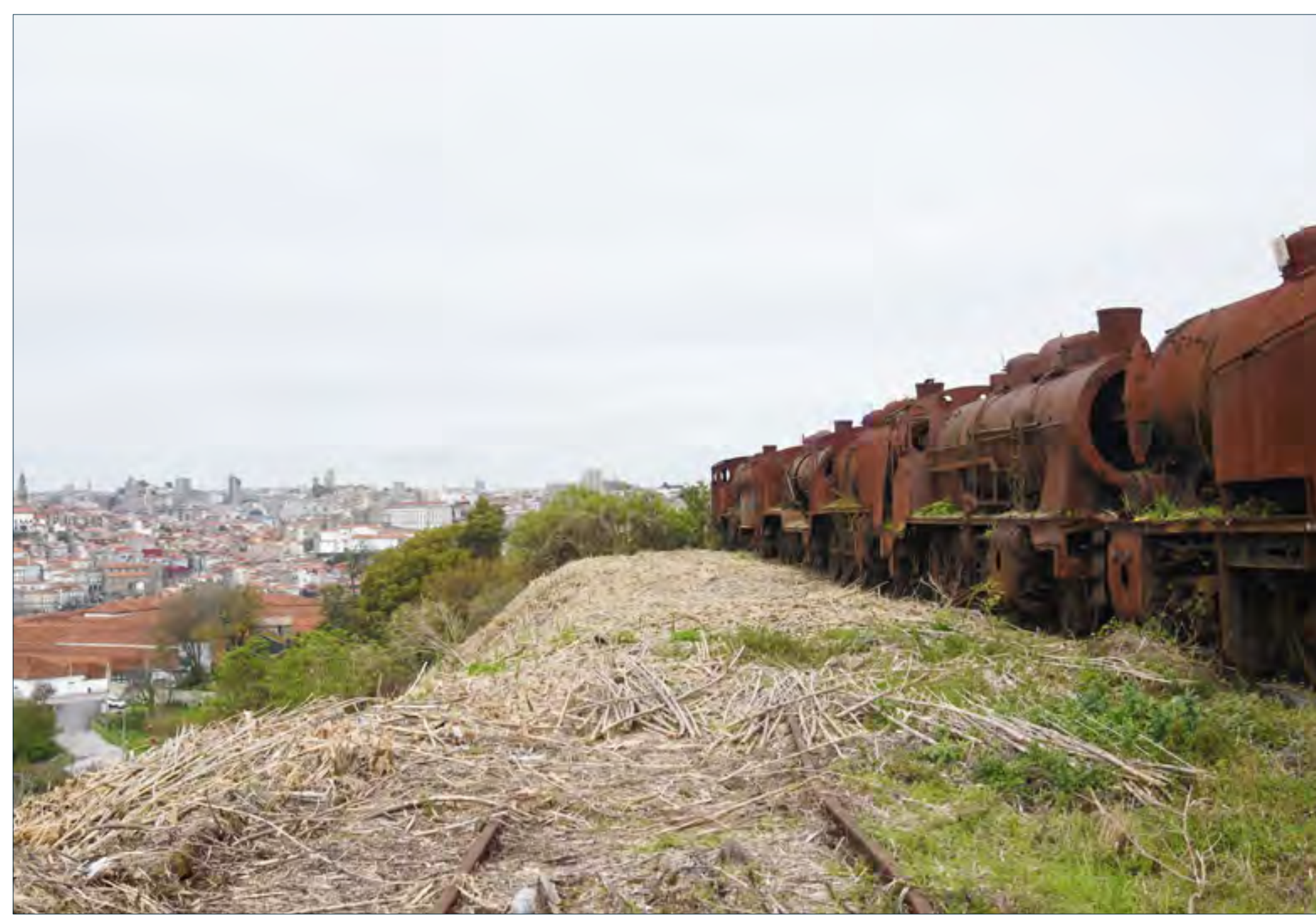
A line of six derelict steam locos stands high above the valley of the Duoro at Vila Nova de Gaia with Porto visible in the distance. 2-8-0 No. 701 is the first loco. John Sloane