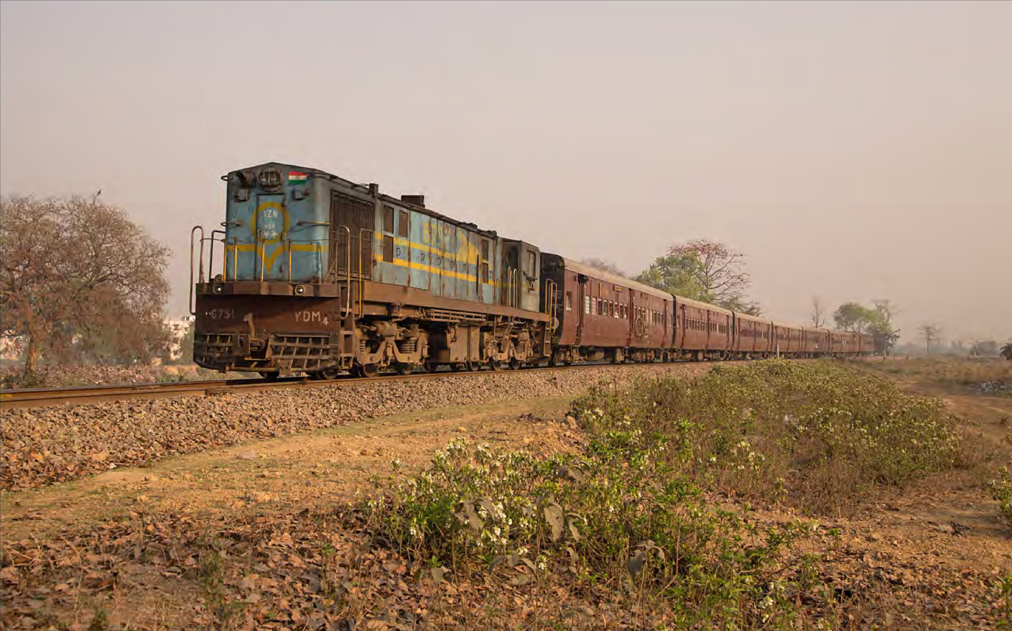
On March 13th, a metre gauge passenger service hauled by YDM4 No. 6751 approaches Bahraich with a train from Mailani - the longest current operational metre gauge run. Mark Torkington