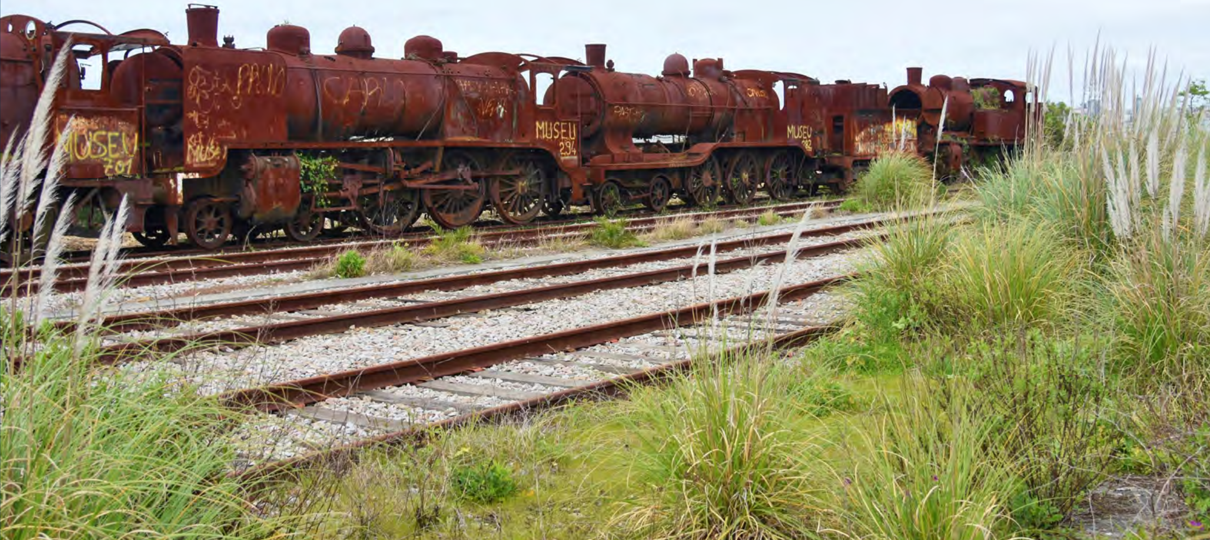
Derelict 4-6-0's Nos. 294 and 282 along with 2-6-4T No. 072 continue their long wait for restoration in Vila Nova de Gaia Yard.