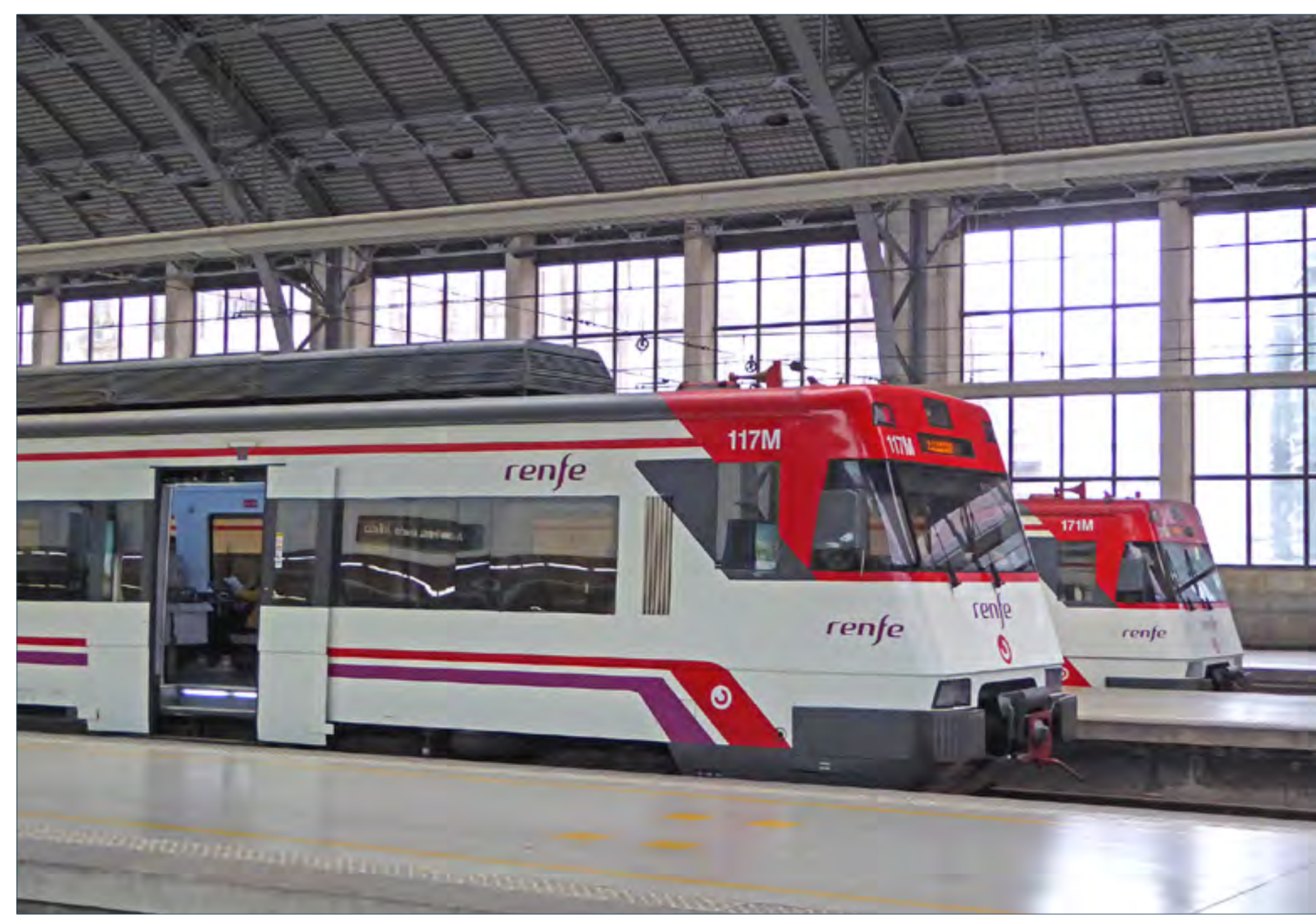
Renfe Class 446 EMU No. 117M has just arrived at RENFE station Bilbao with a service from Llodio on May 9th.