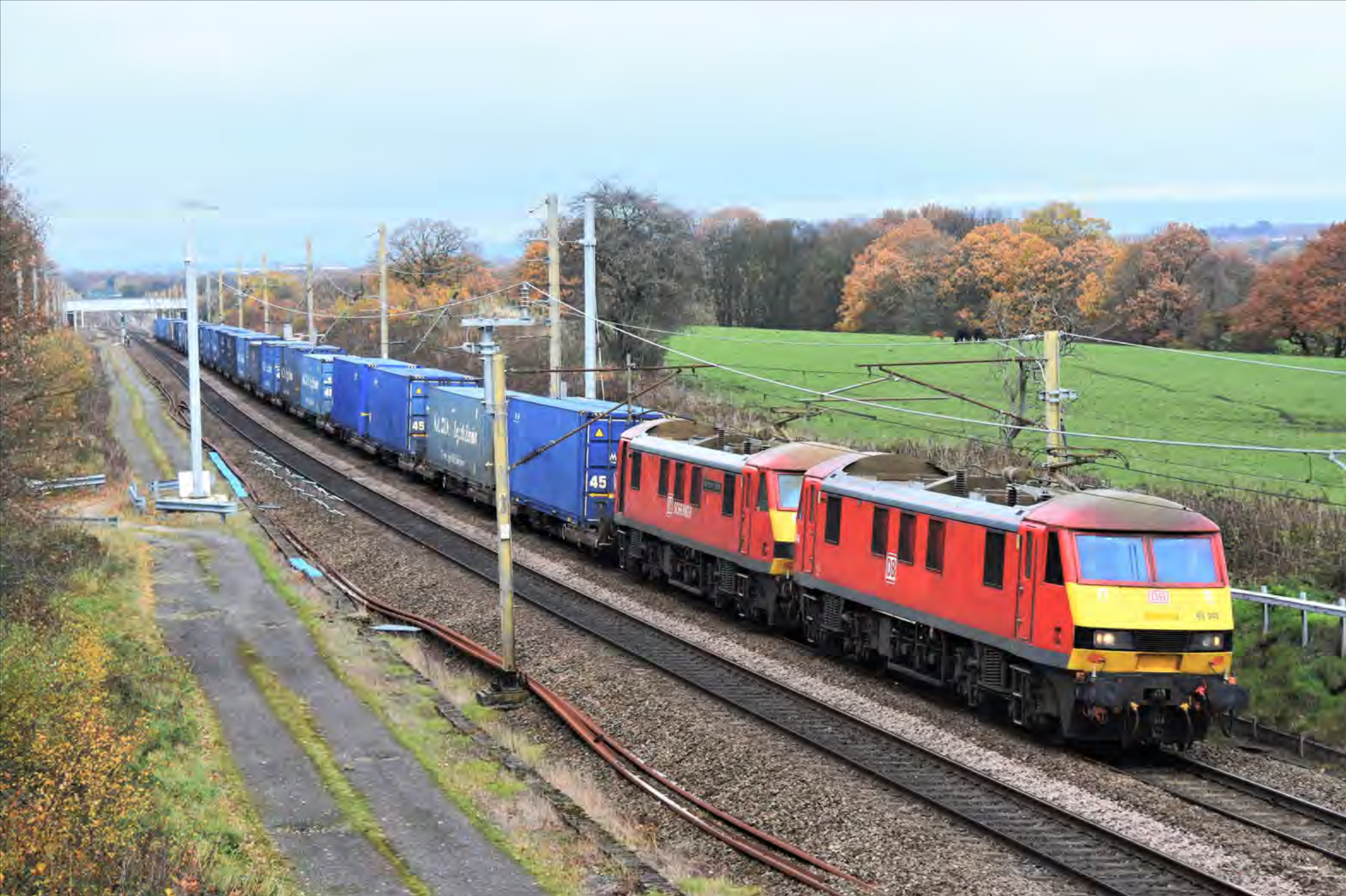
Class 90 040 and 90 018 pass through Charnock Richard on November 14th hauling the 4M25 Mossend - Daventry intermodal.