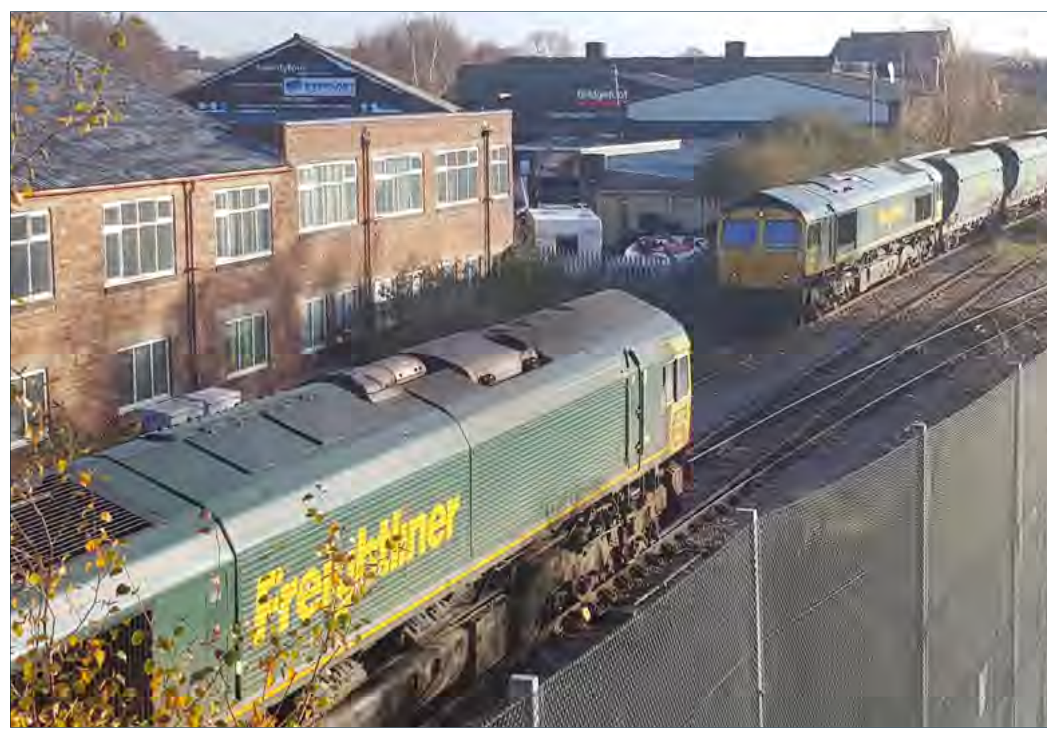
▶ An increasingly rare scene ... 2 trains running round at Latchford sidings as Class 66 621 waits with a train of empty limestone hoppers heading for Fiddlers Ferry while 66 953 arrives on empty coal heading for York, November 30th. Mark Enderby