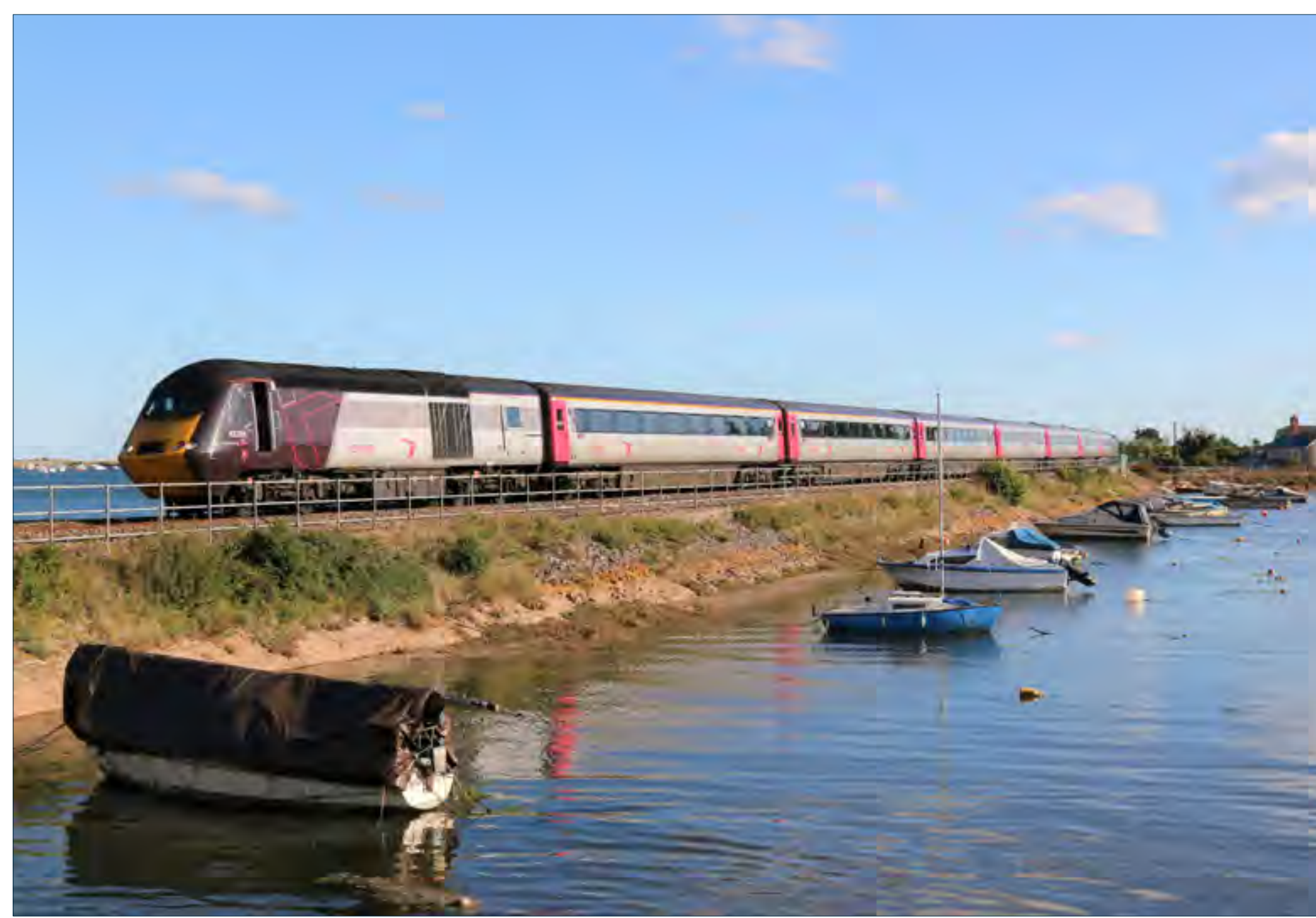
▶ A Class 220 passes Boat Cove, Dawlish with a Manchester Piccadilly - Paignton service.