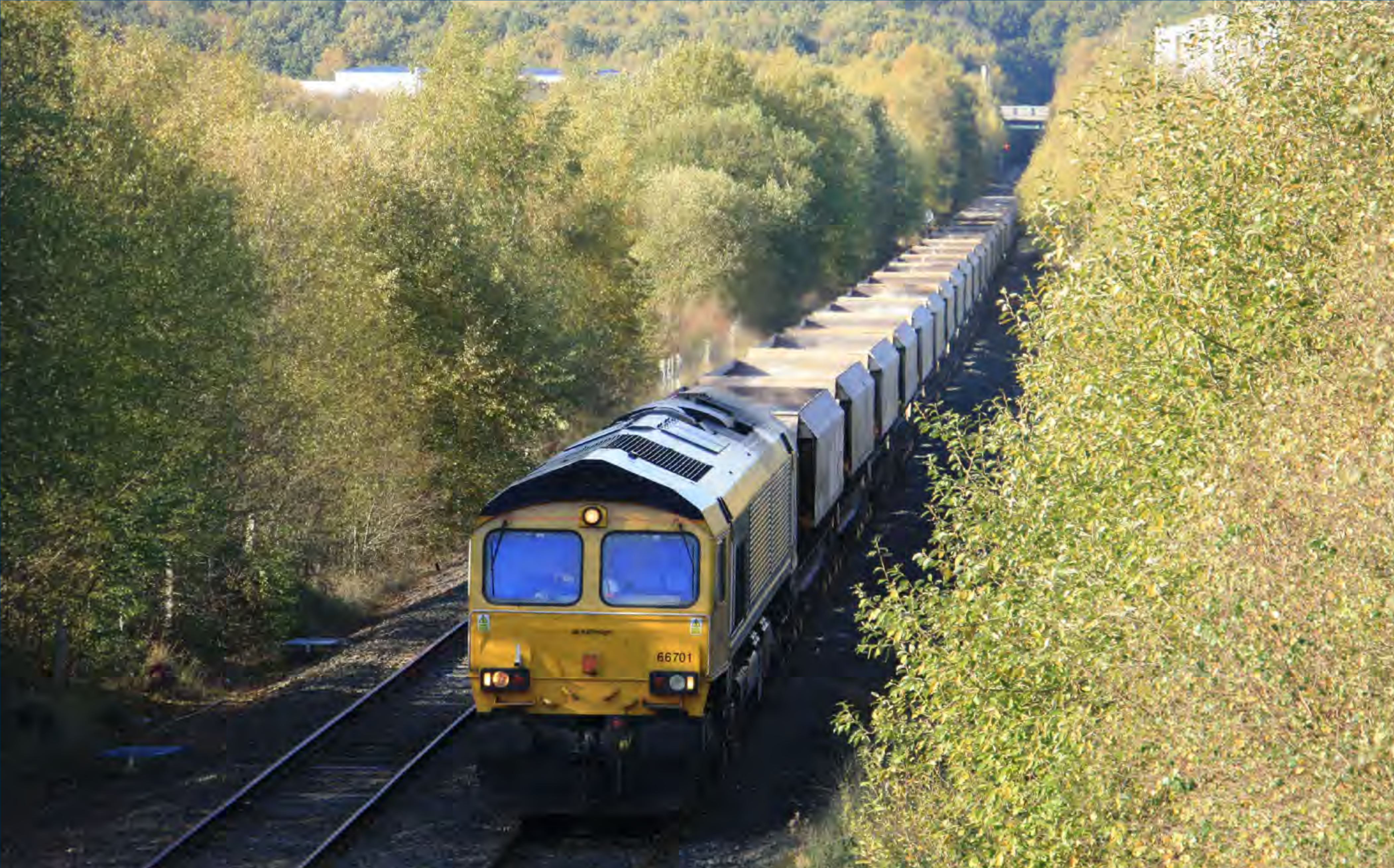
▶ Class 66 701 working 6M83 Tinsley - Bardon Hill empty stone hoppers is seen near Moira on October 31st. Stuart Hillis