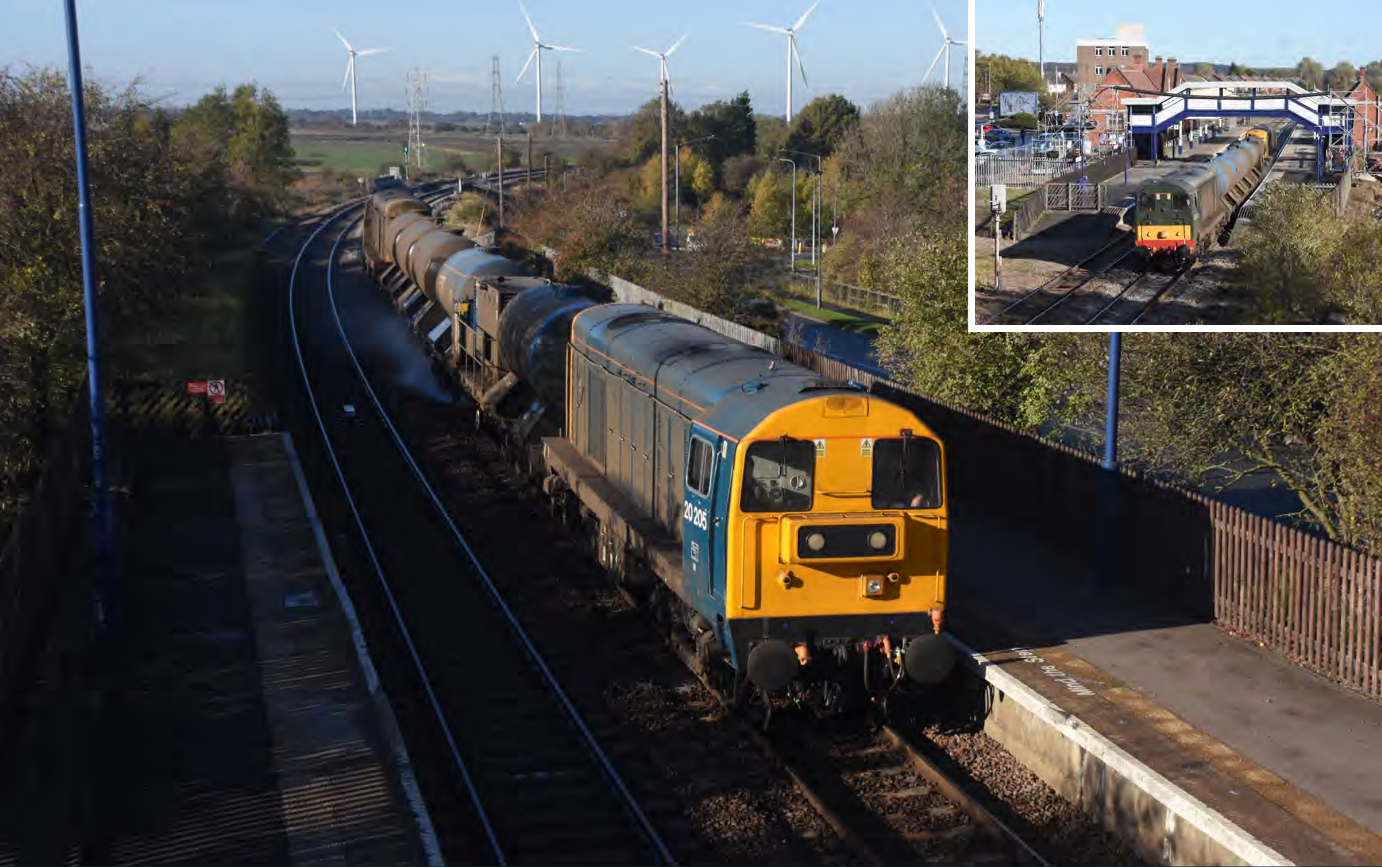
On November 2nd, hired-in Class 20 205 and 20 007 are seen working the 3S13 Wrenthorpe - Pasture St. RHTT through Althorpe. Inset: 20 007 leads 20 205 with the 3S14 Pasture St - Bridlington return working through Scunthorpe. Steve Thompson