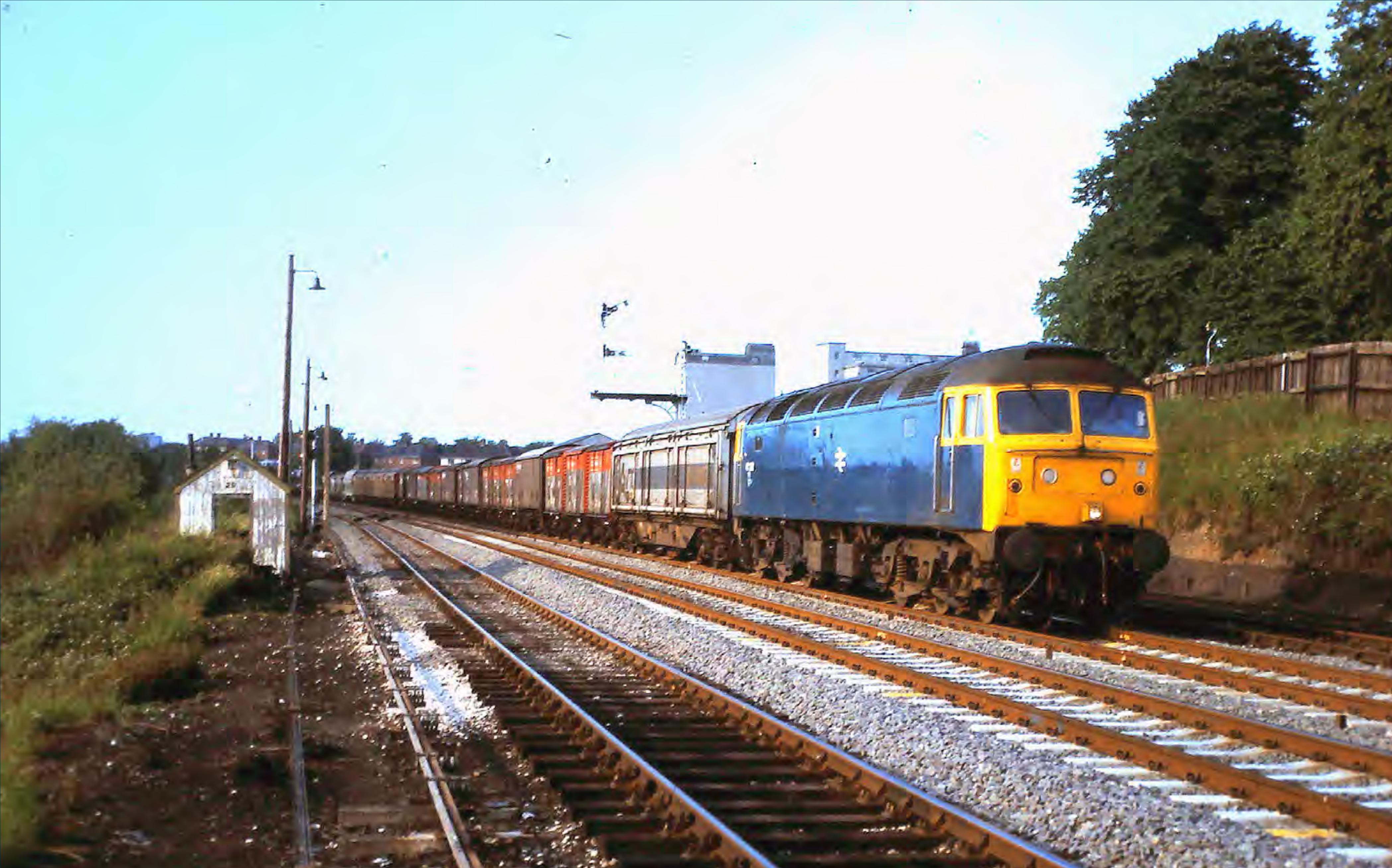
▶ Class 47 238 on Crewe Bank, Shrewsbury with the 6V93 Mossend Yard - Severn Tunnel 'Speedlink' service on June 18th 1984.