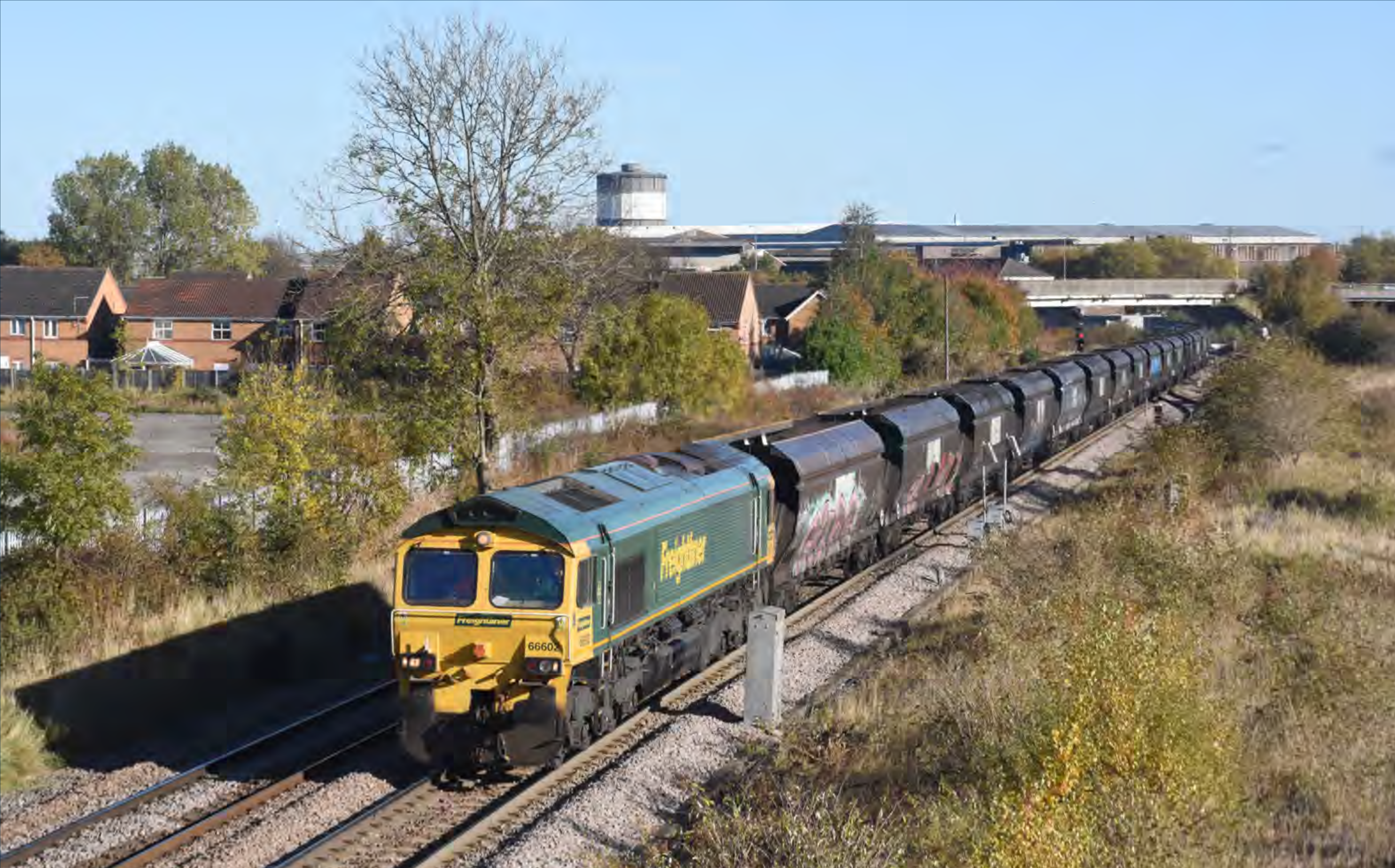
▶ Class 66 602 hauls 4E73 coal empties from Scunthorpe CHP to Hunslet Yard through Scunthorpe on November 2nd.