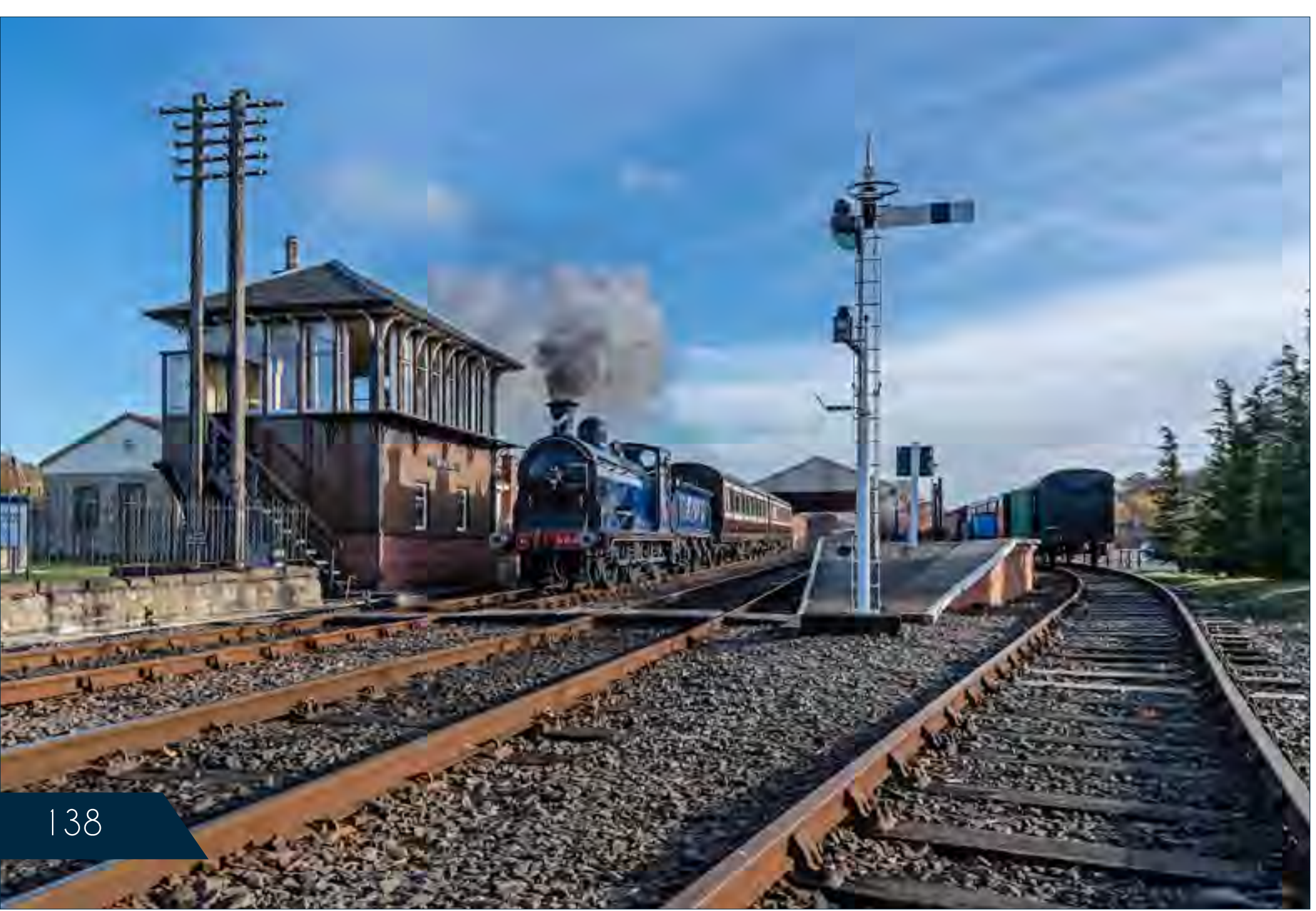
▶ 'Caley 828' is seen departing Bo'ness. Shep Woolley