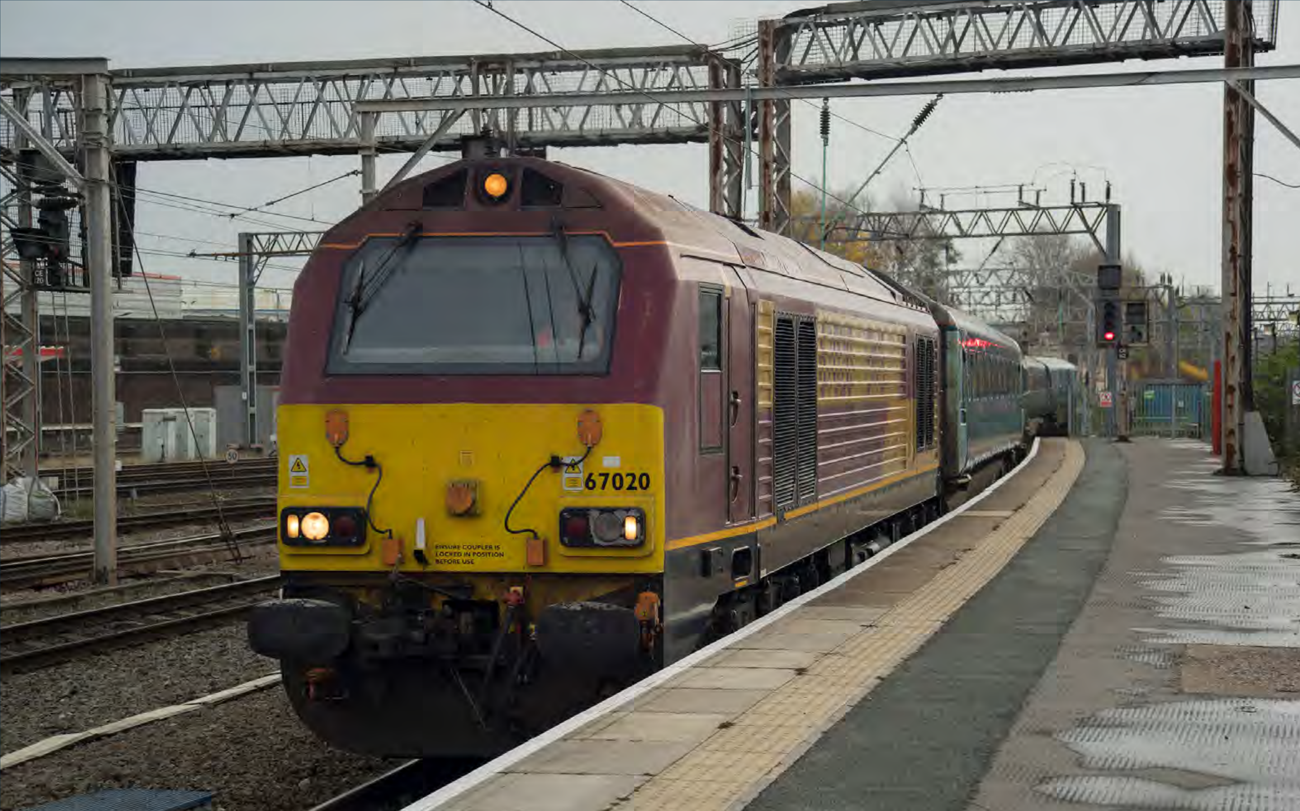
▶ Class 67 020 arrives into Crewe on November 10th with an ECS working. Brian Battersby