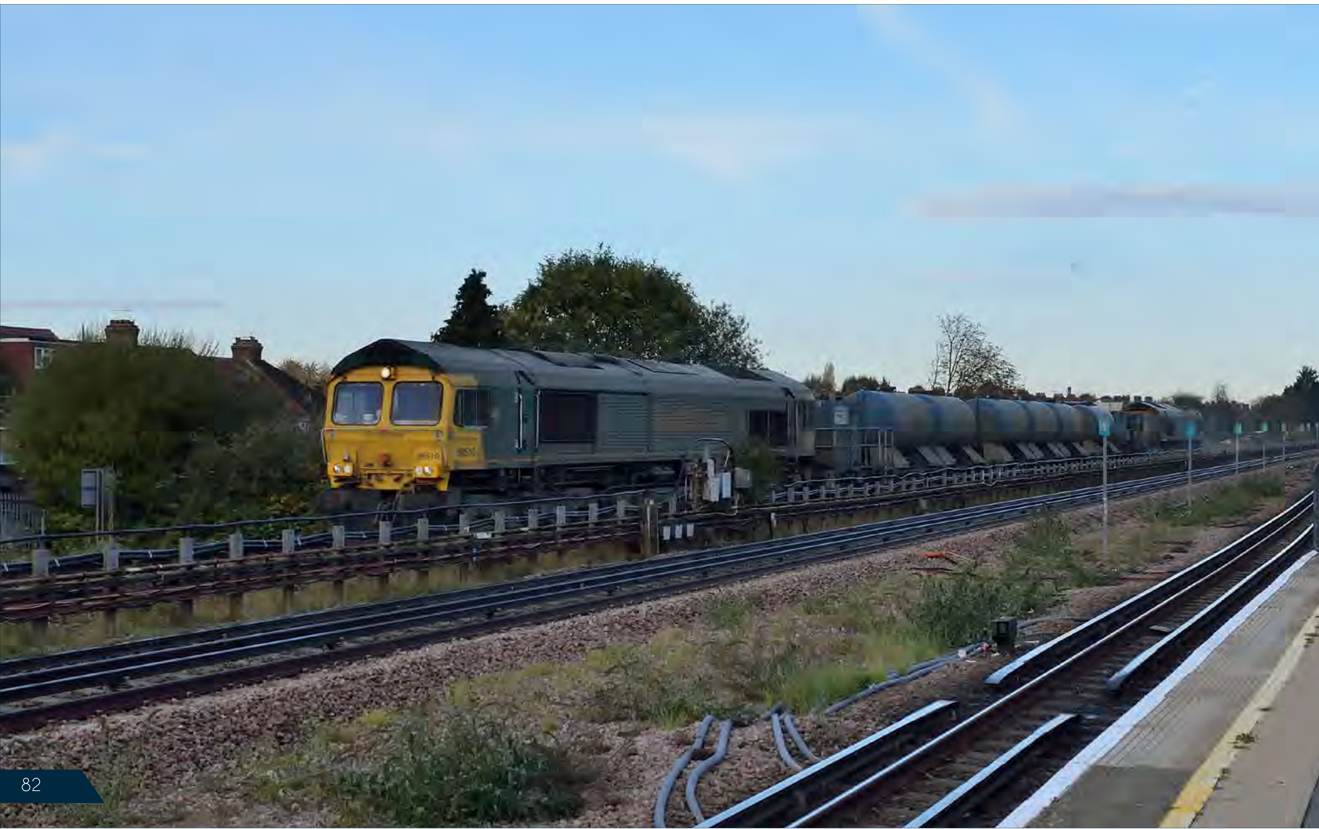
▶ Class 20 305 and 20 303 are seen at Gascoigne Wood on November 8th with 3S14 Sheffield to Hull RHTT.