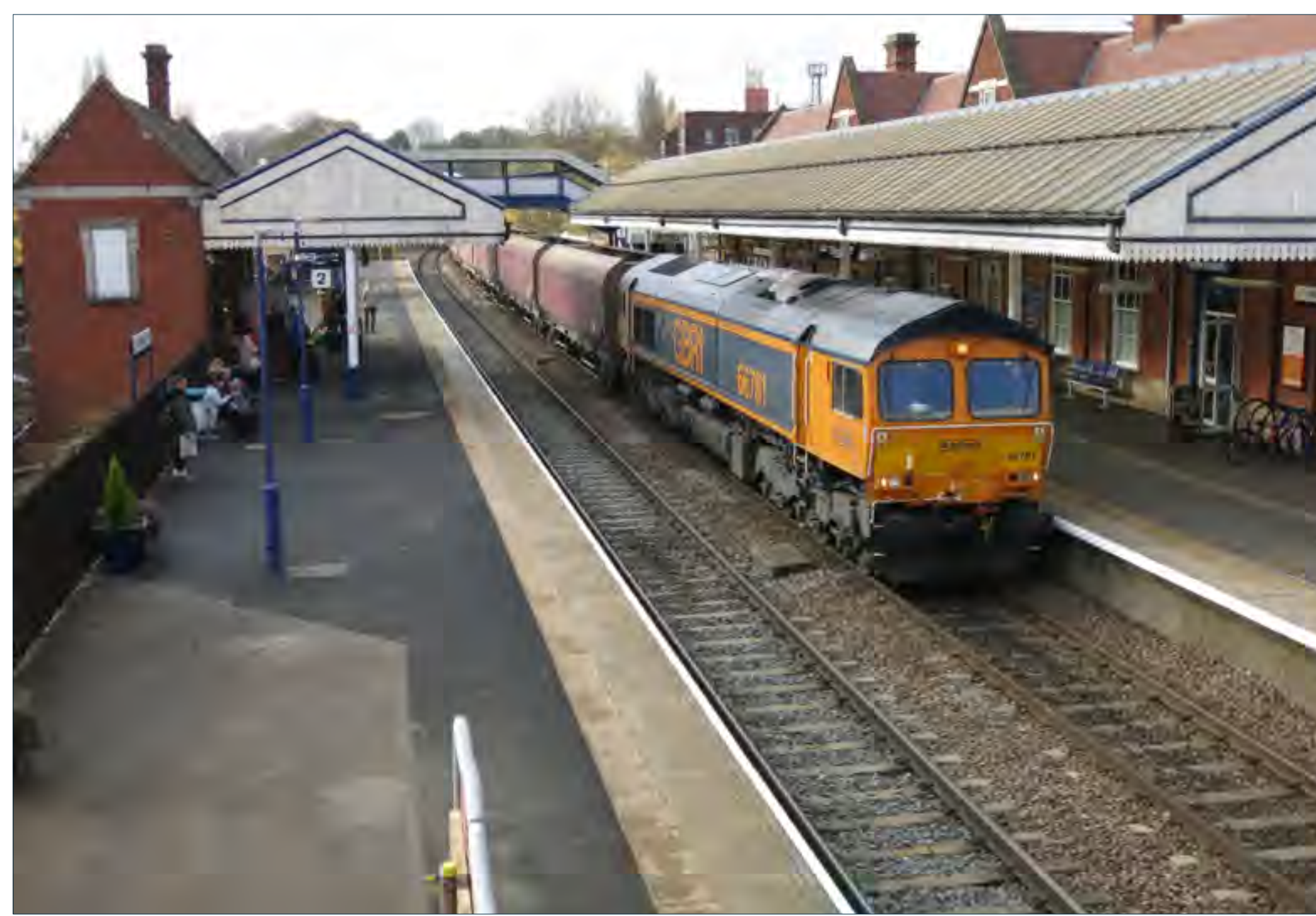
▶ Class 66 781 heads through Scunthorpe on November 15th with 4R79 Down Decoy - HIT empty coal.