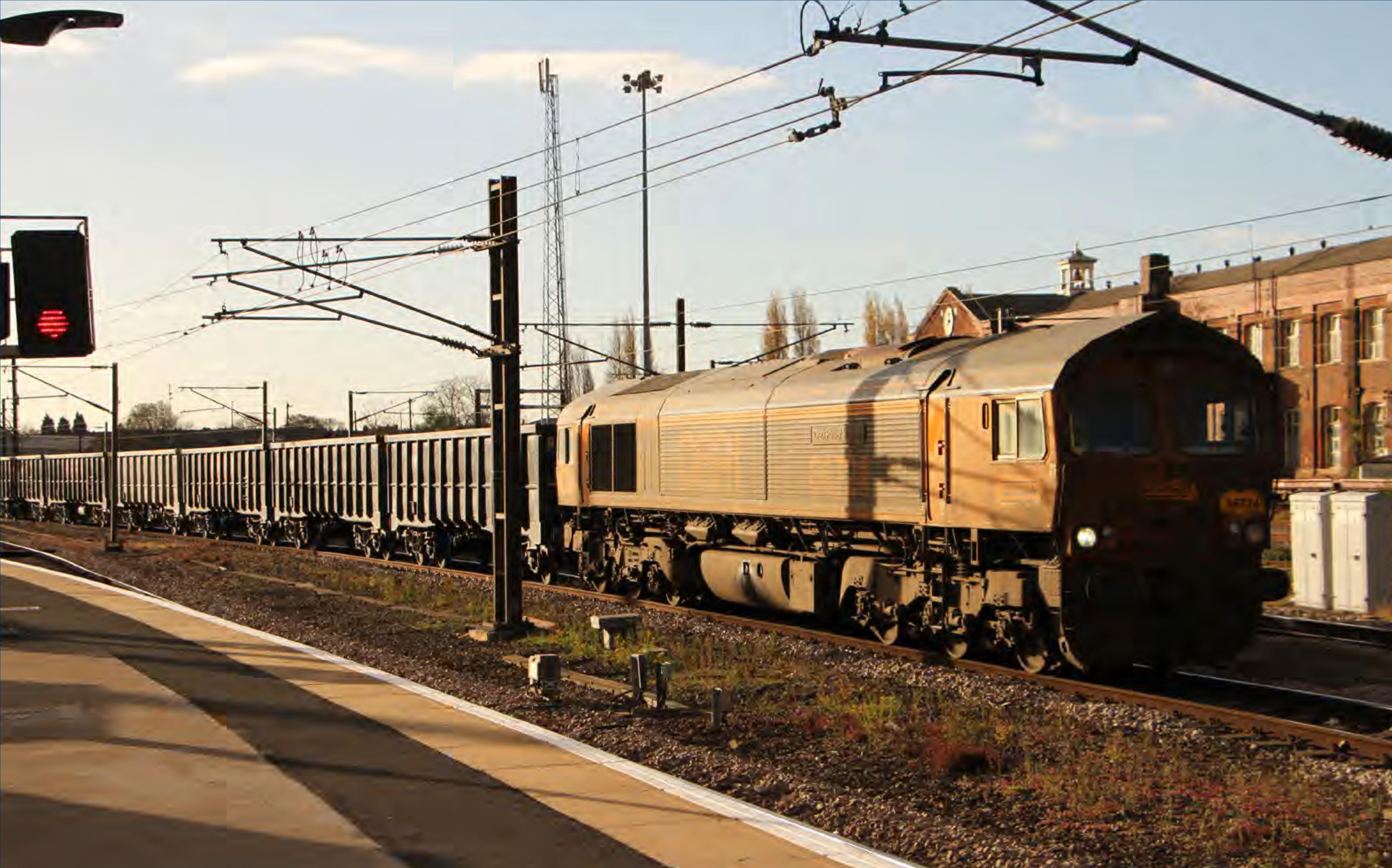
▶ On November 13th, the 6M31 09:29 Doncaster Down Decoy GBRf to Arcow Quarry GBRf eases round the back of Doncaster station behind Class 66 724 'Drax Power Station'. Derek Elston