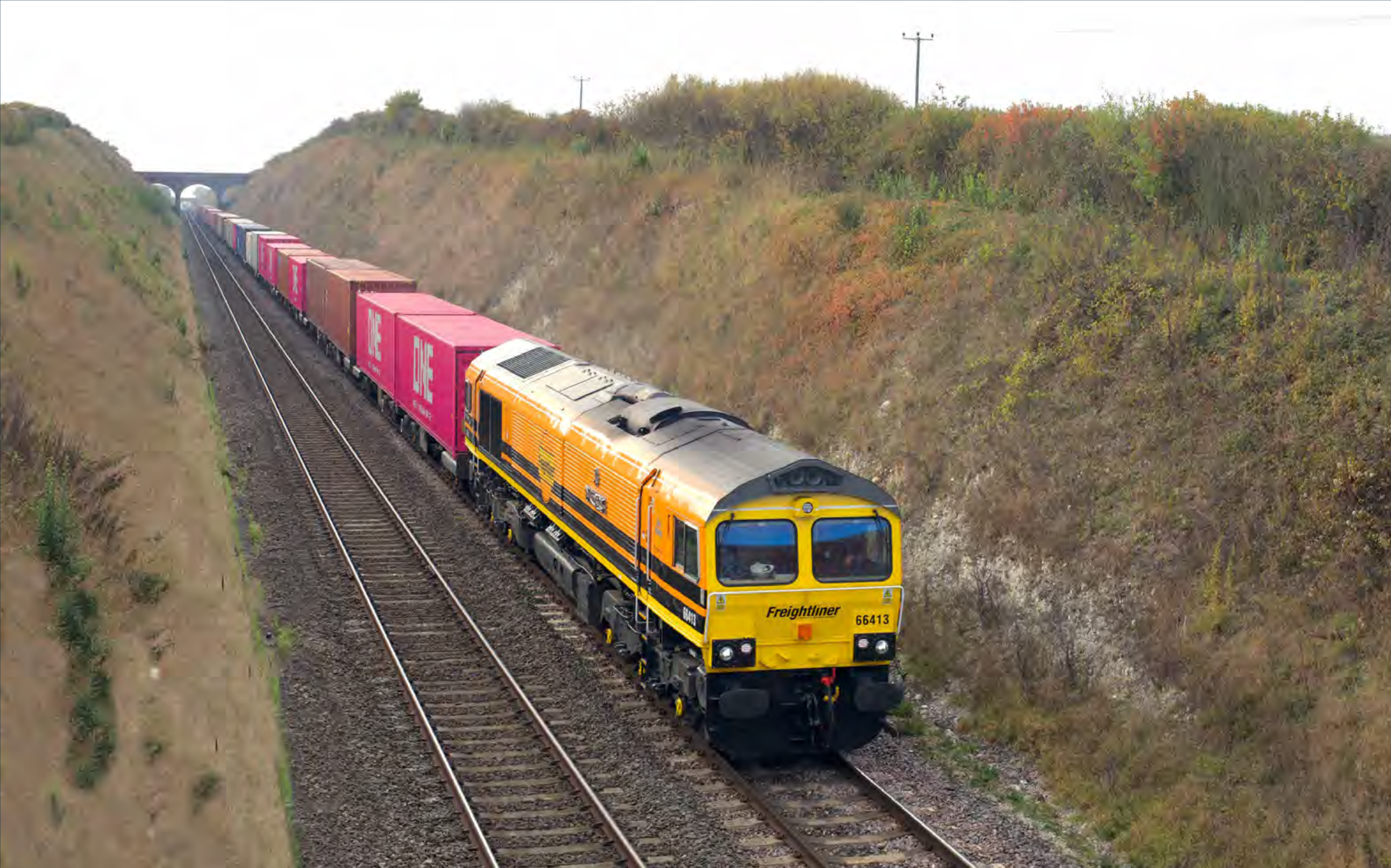
▶ Class 66 413 passes Apsley near Whitchurch, hauling a Southampton - Trafford Park liner.