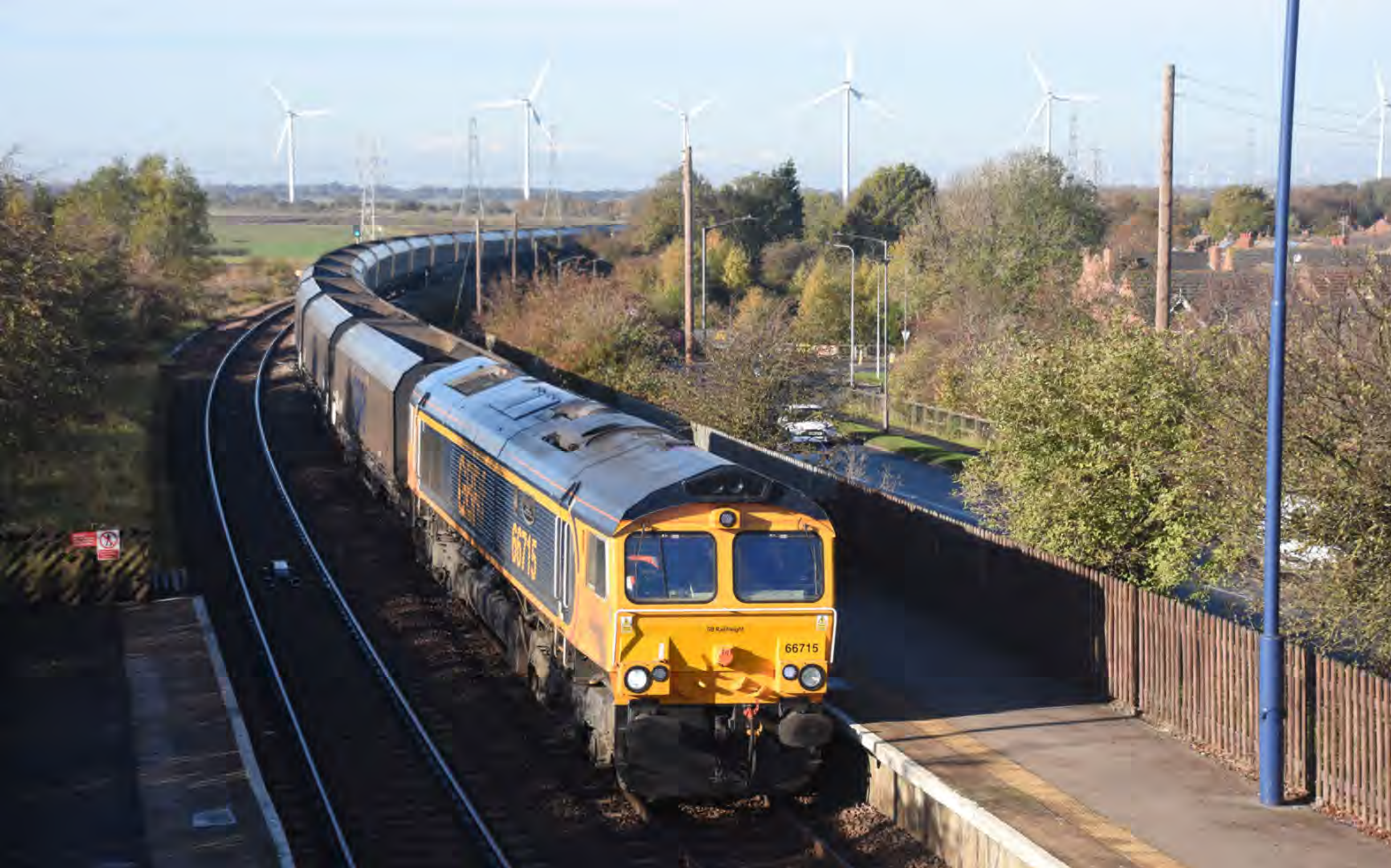
▶ On November 2nd, Class 66 715 passes Althorpe on 4R13 Down Decoy - HIT coal empties.