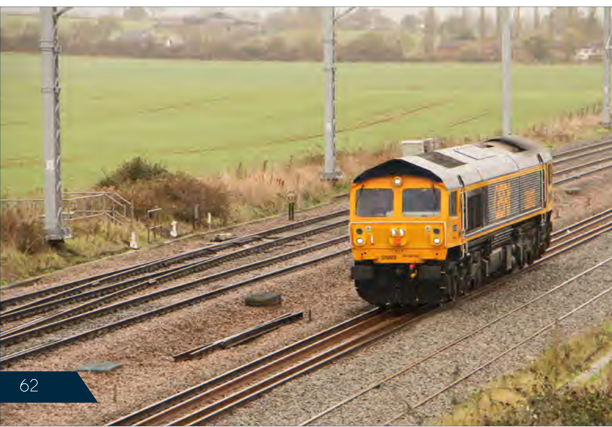
▶ Class 66 736 'Wolverhampton Wanders' leads the 6D16 09:32 Cottam Power Station GBRf to Ferrybridge power station Gypsum GBRf through Doncaster on November 13th. Derek Elston