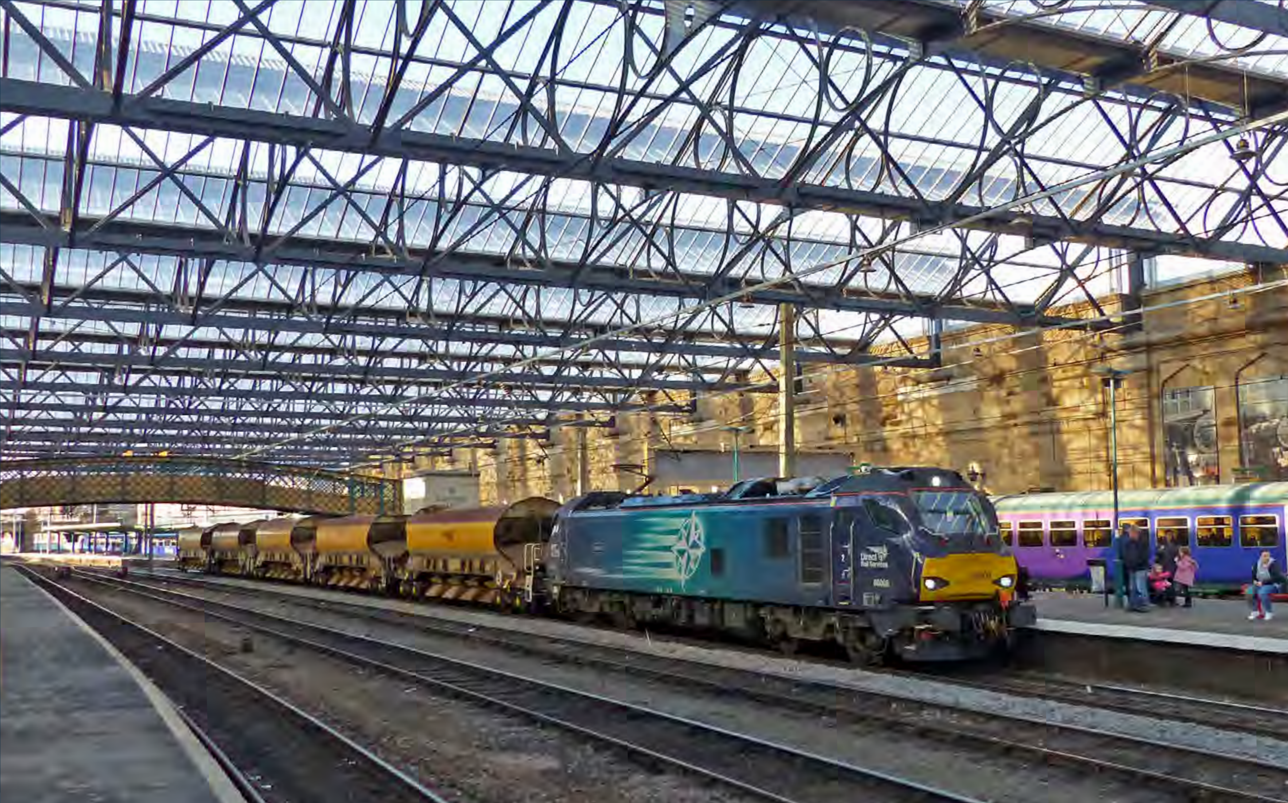
On November 1st, Class 88 008 passes through Carlisle with infrastructure wagons working from Carlisle - Crewe.