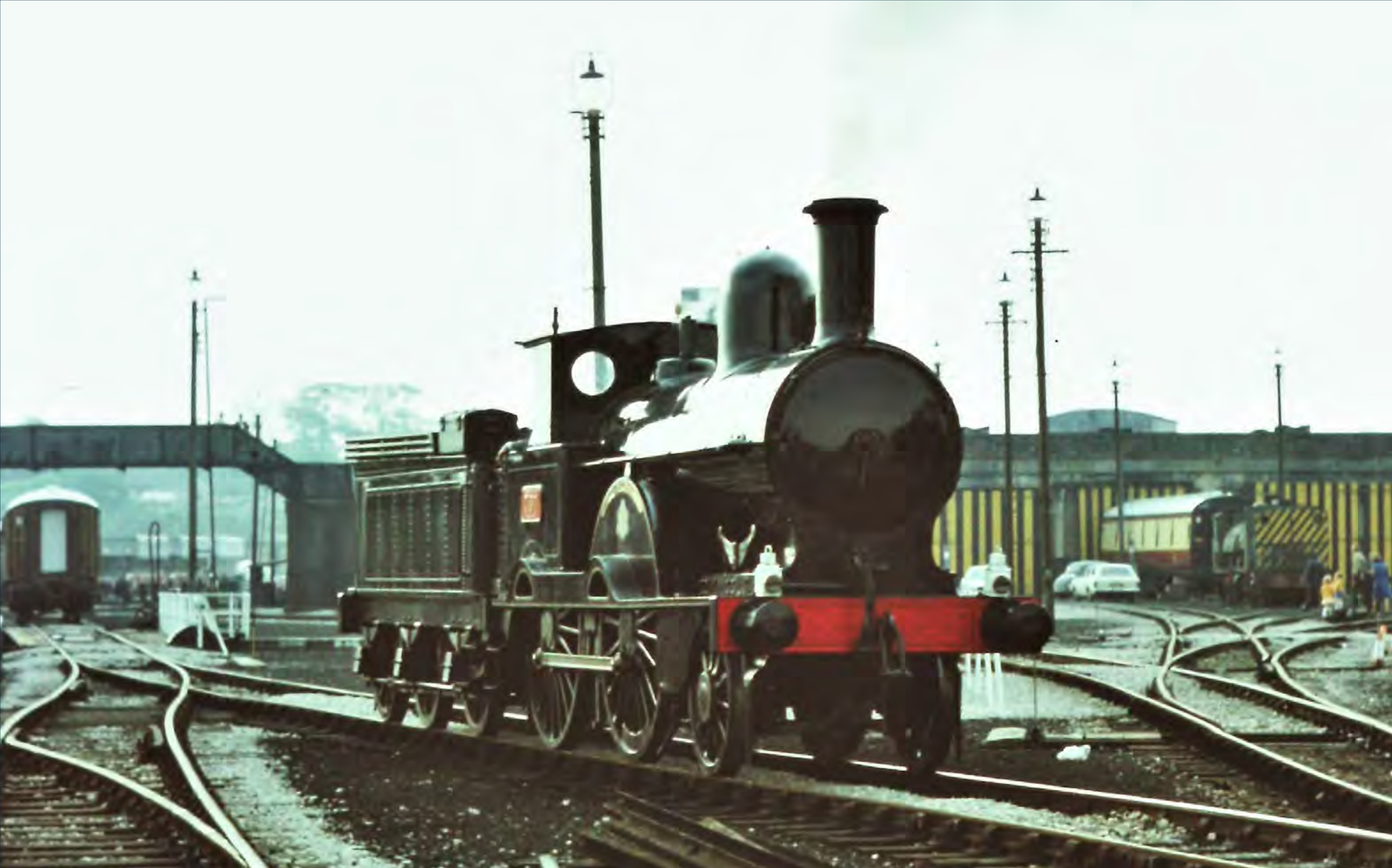
On May 9th 1976, LNWR No. 790 'Hardwick' is seen at Carnforth prior to working a special to Grange over Sands.