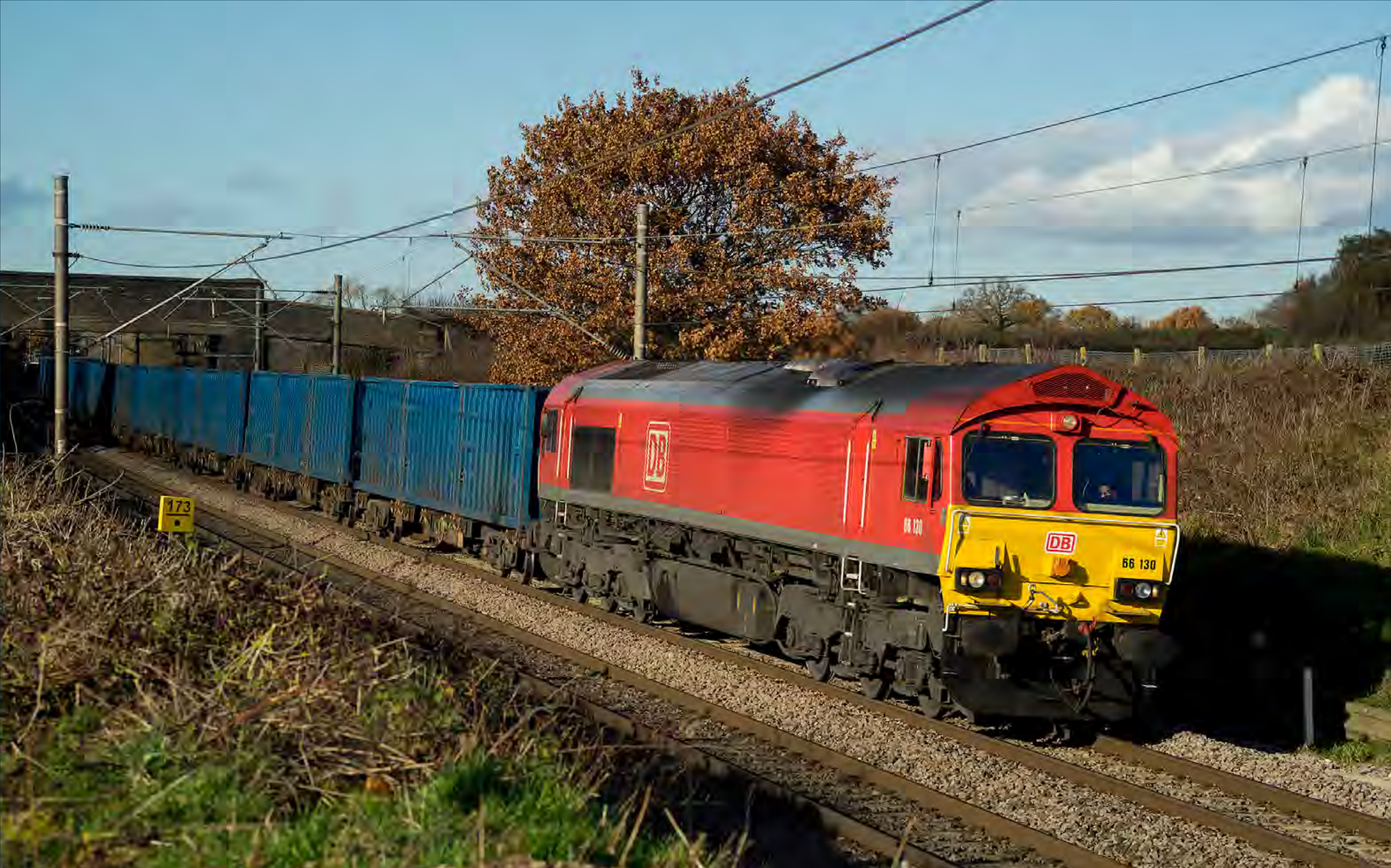
On November 13th, Class 66 130 speeds through Acton Bridge with a southbound bin train . Brian Battersby