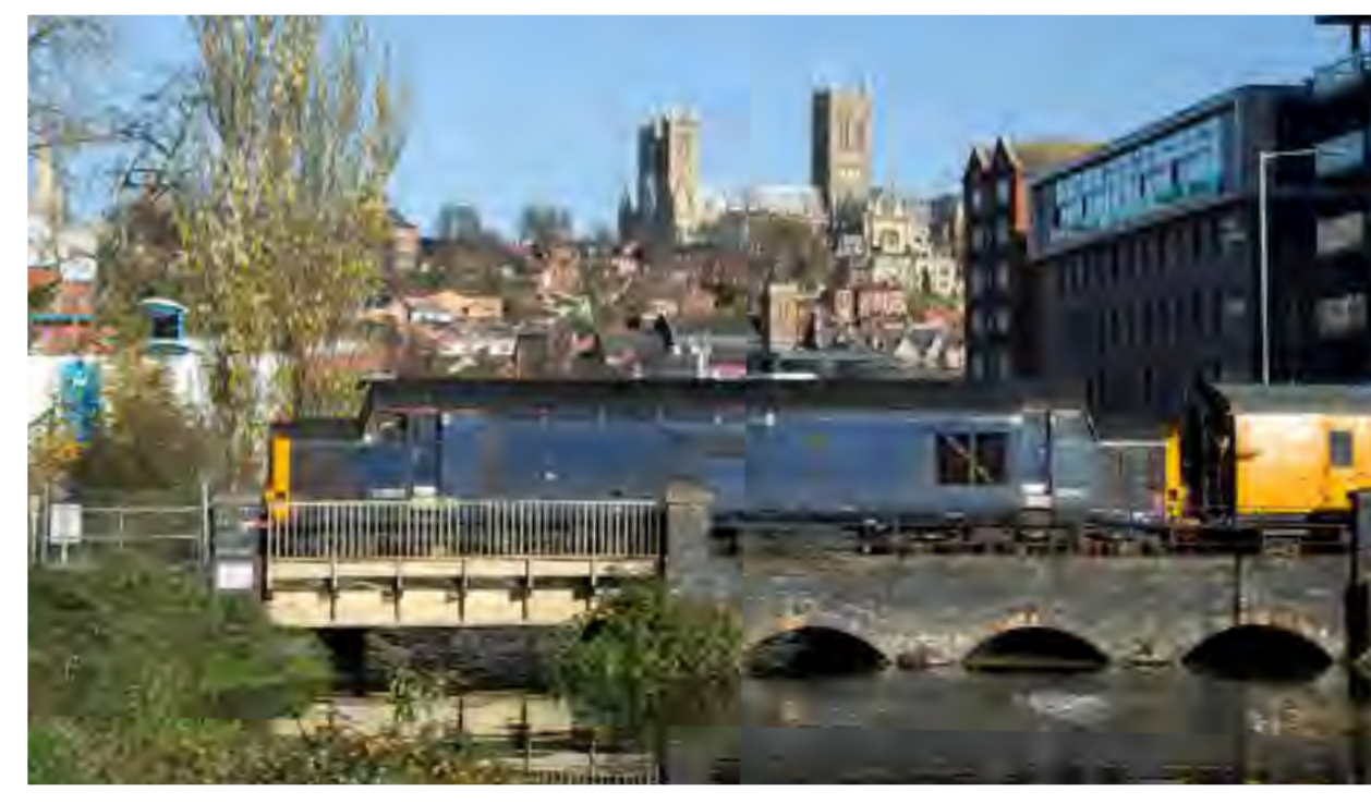
Class 56 087 and 56 078 top'n'tail the North Wales RHTT through Chester on November 10th. Brian Battersby