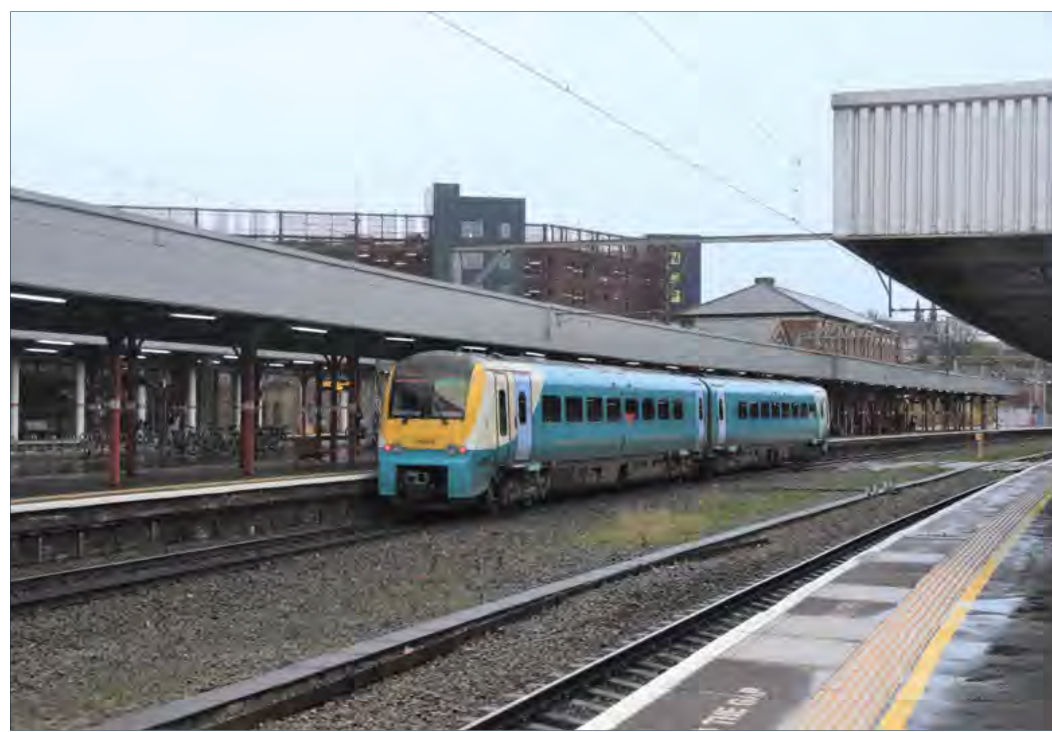
▶ Class 175 107 stands at Chester on November 15th working a service to Manchester. Brian Battersby