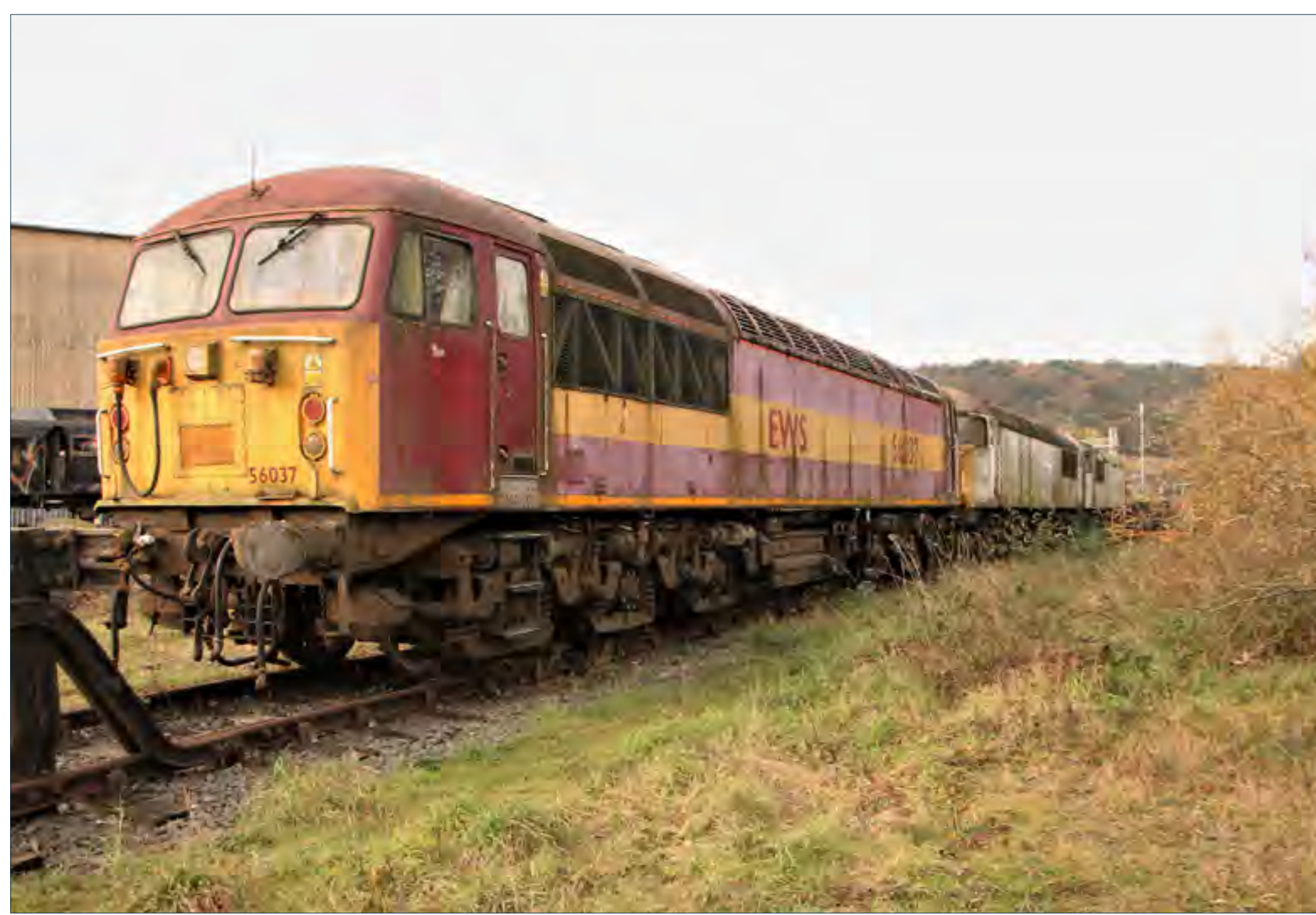
Class 56 037 and 56 032 are seen at EMD Longport on November 24th. Derek Elston