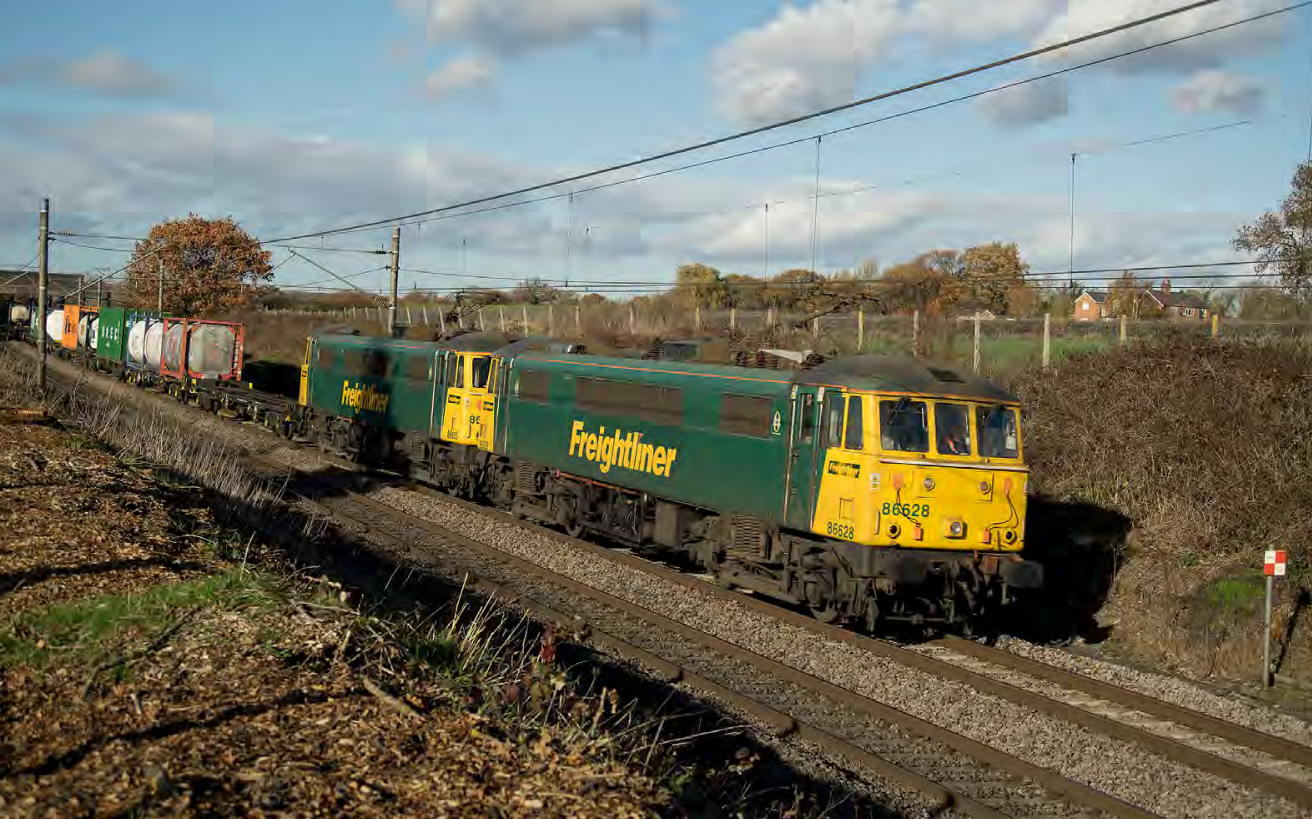
▶ Class 86 628 and 86 605 pass through Acton Bridge on November 13th heading towards Crewe. Brian Battersby