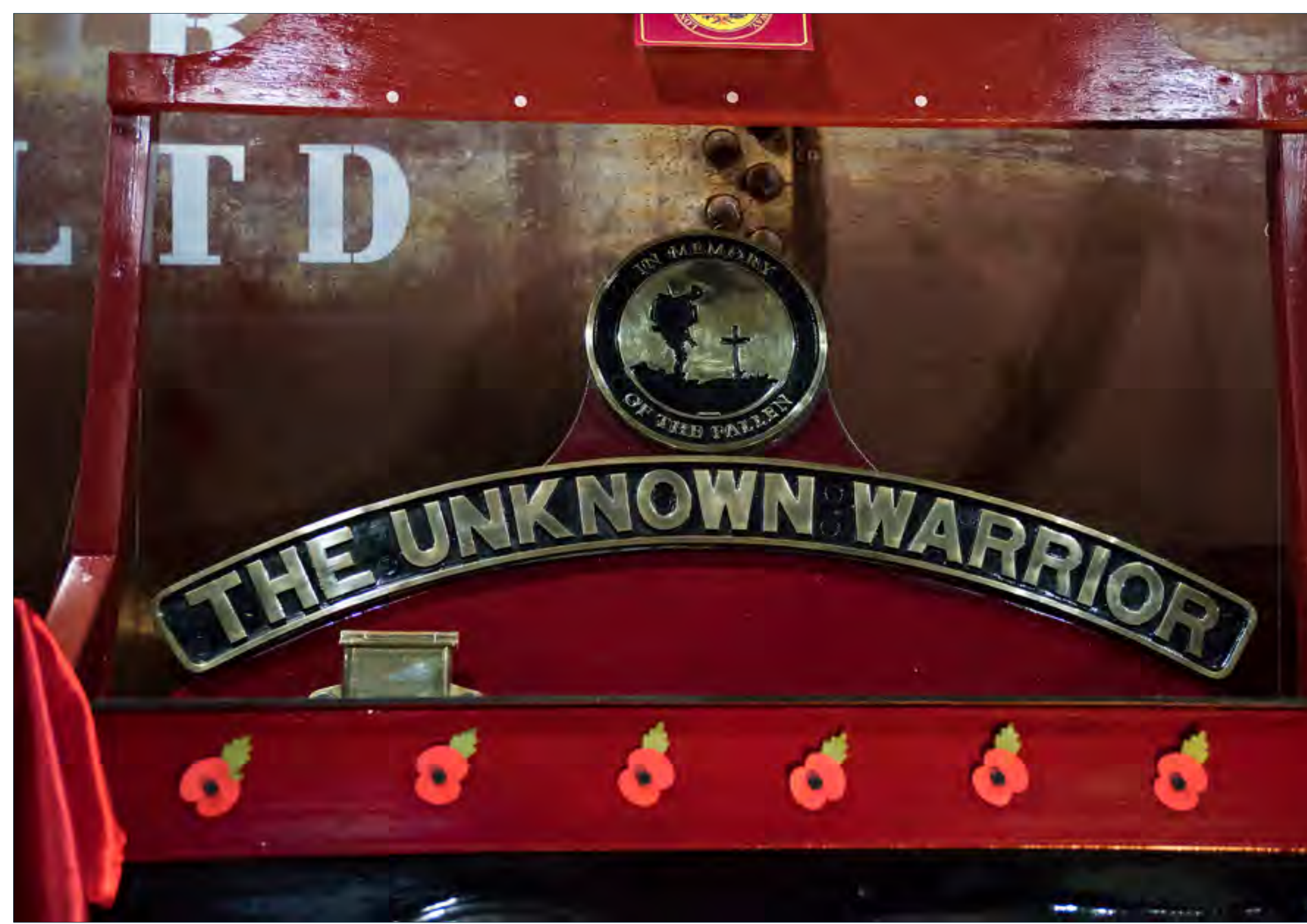
LMS Patriot Class No. 5551 'The Unknown Warrior' is seen being named by Simon Weston CBE at an event on November 10th.