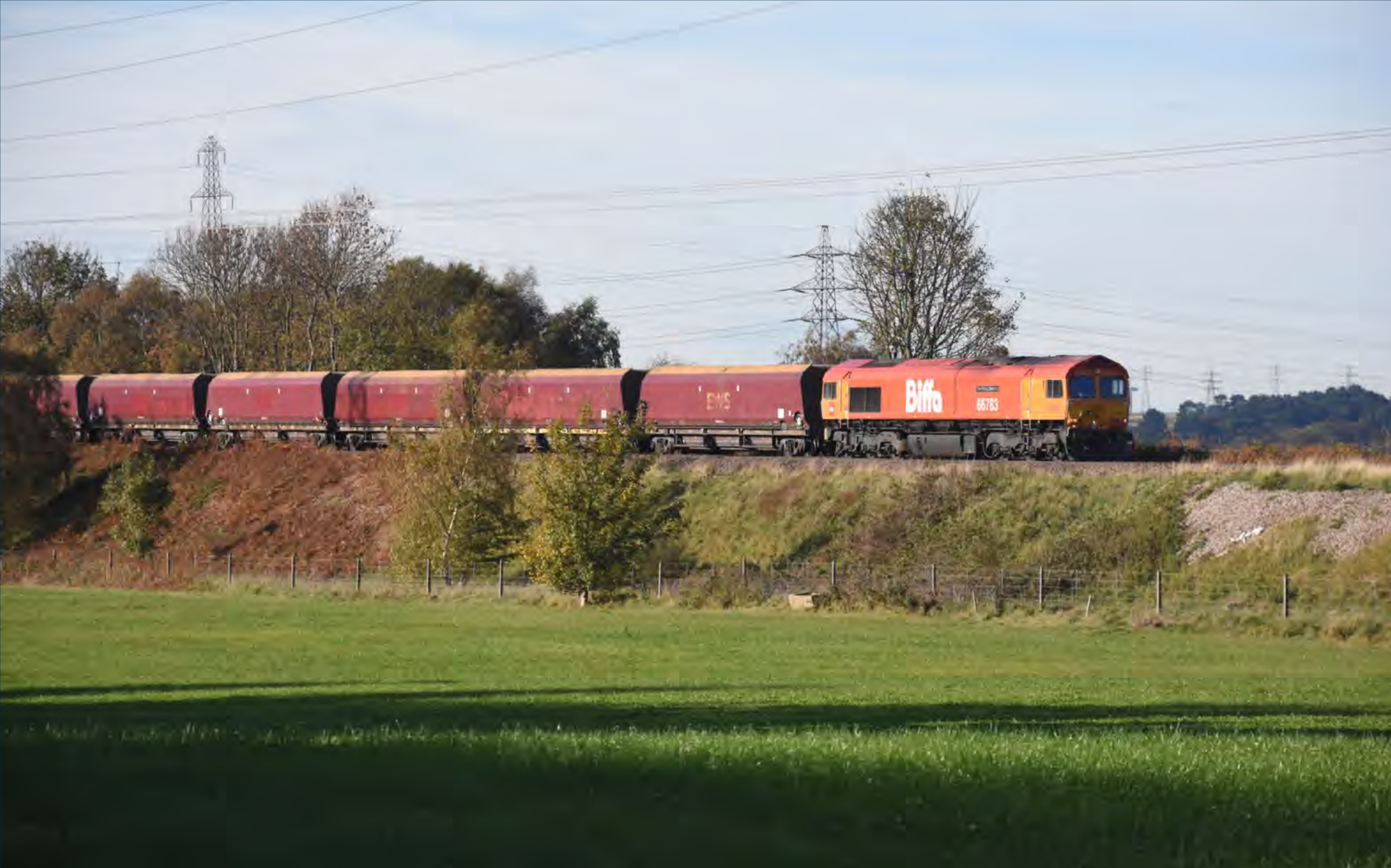
On October 31st, Class 66 783 descends the bank at Appleby with 4R15 Drax - HIT coal empties.