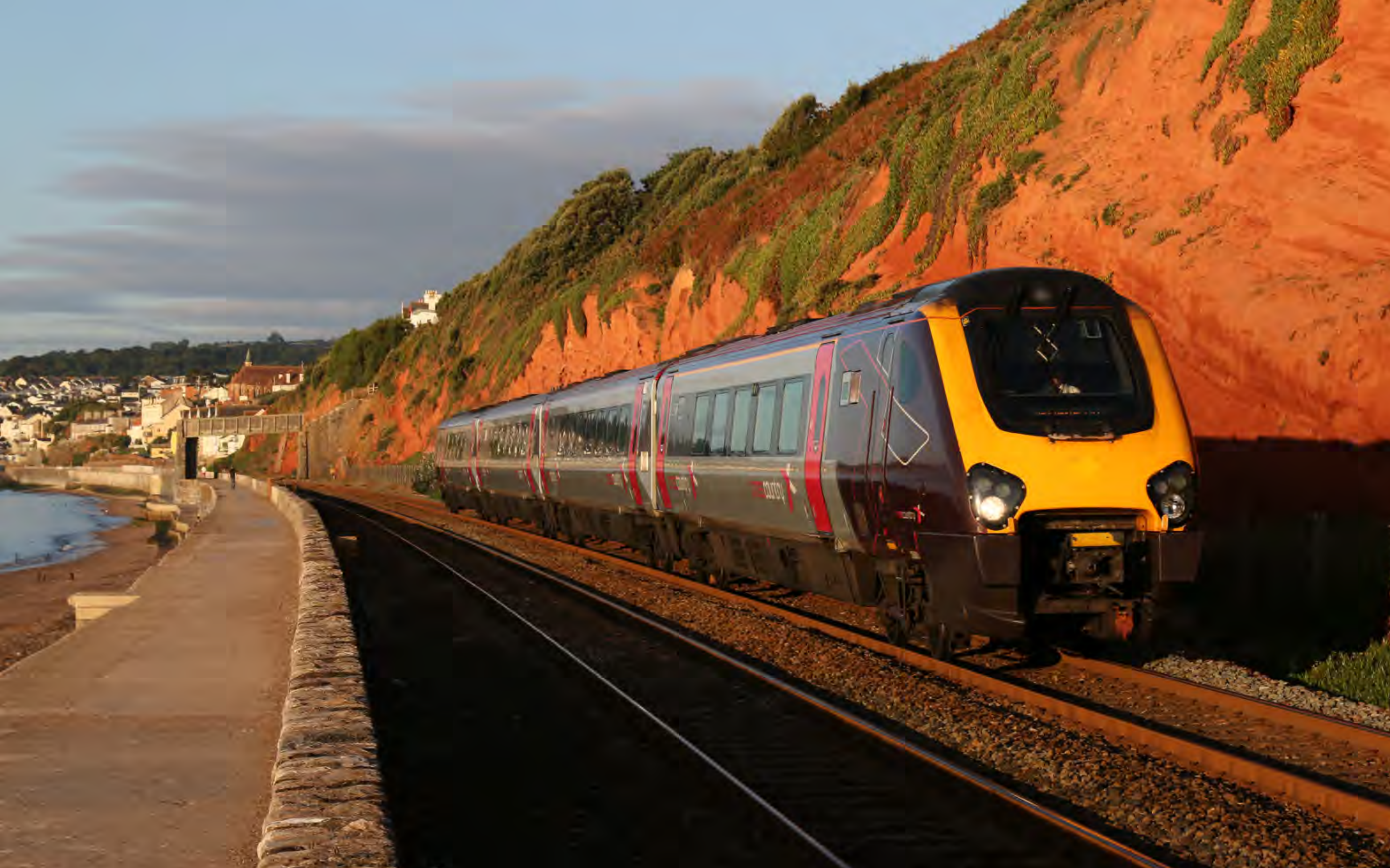
▶ Class 220 006 heads along the Dawlish sea wall with a Plymouth - Birmingham New St. working. Phil Martin