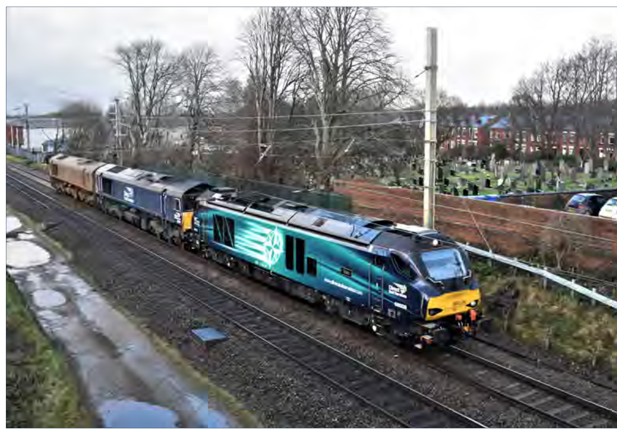
Class 66 421 'Gresty Bridge TMD' passes Balshaw Lane Jct. on November 5th working a Mountsorrel - Carlisle ballast.