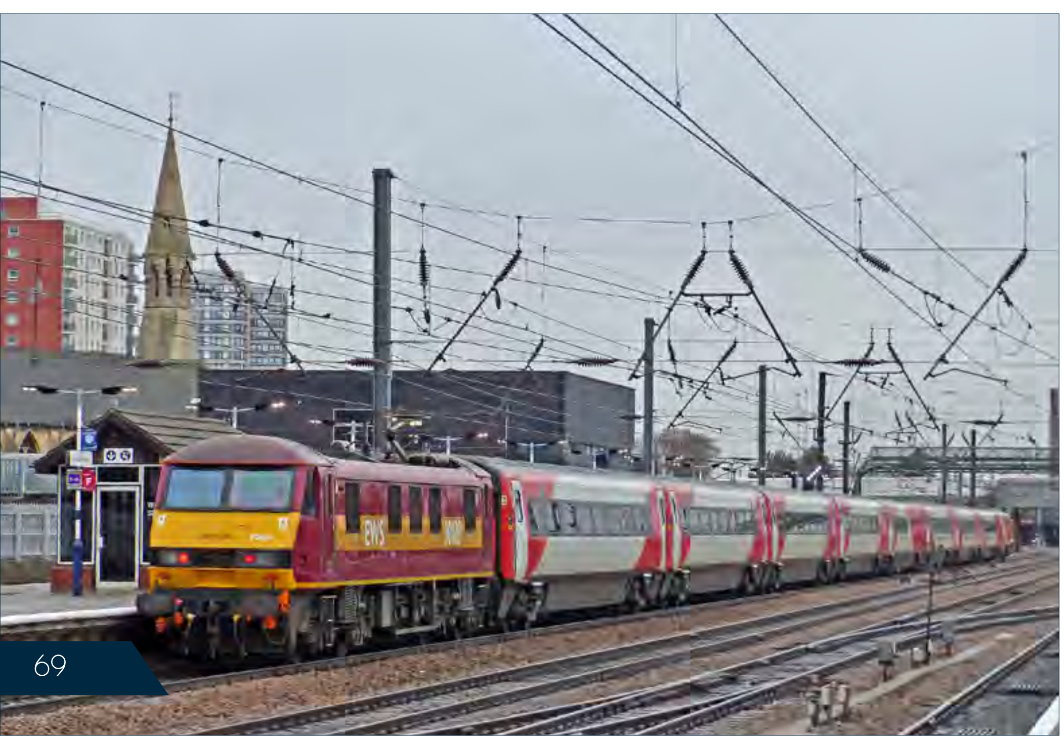
▶ On November 20th, Class 90 039 departs Doncaster working a Leeds - London Kings Cross service.