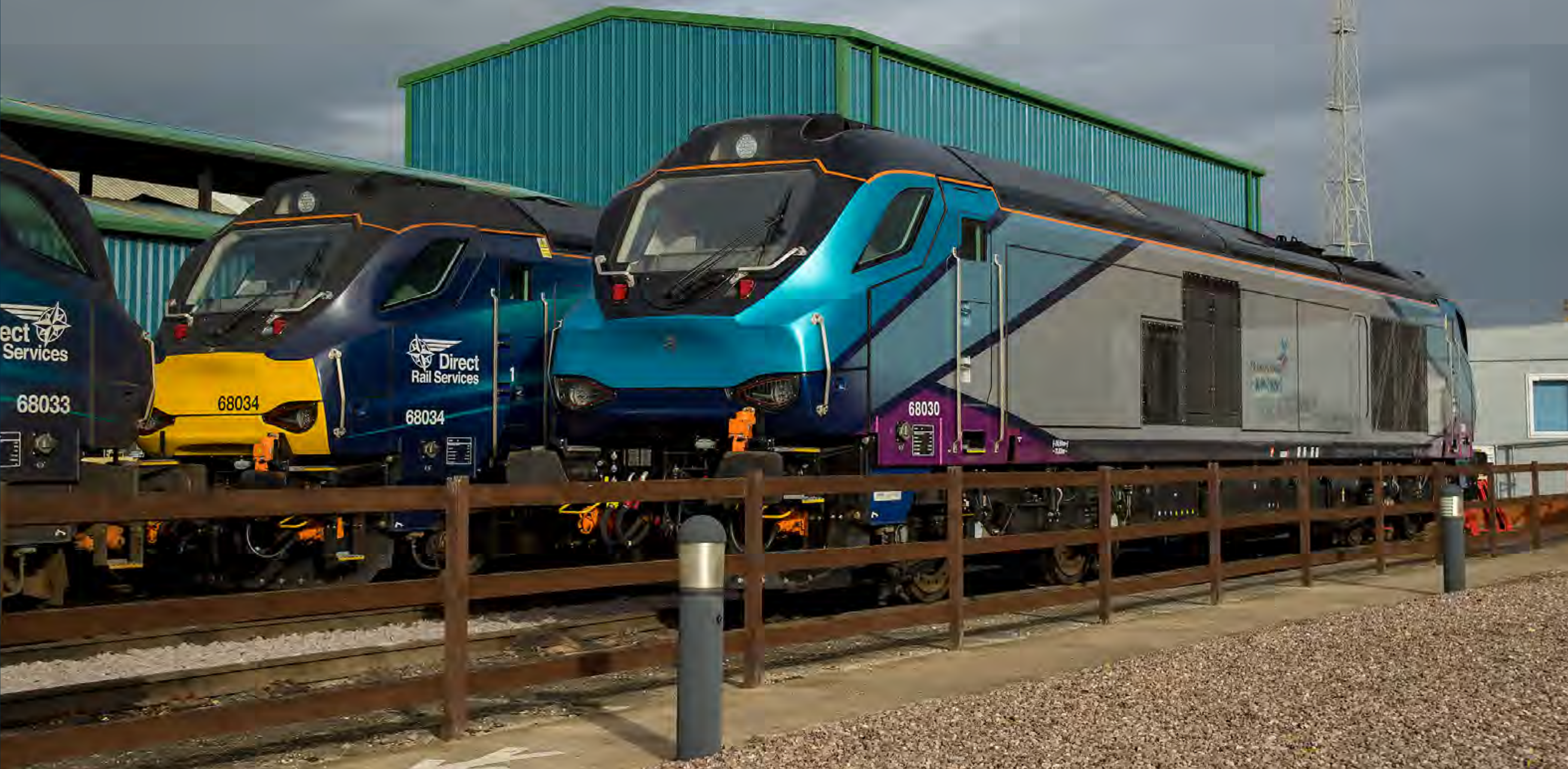
Class 68 030, 68 033 and 68 034 stand on Crewe Gresty Bridge, November 10th. Brian Battersby