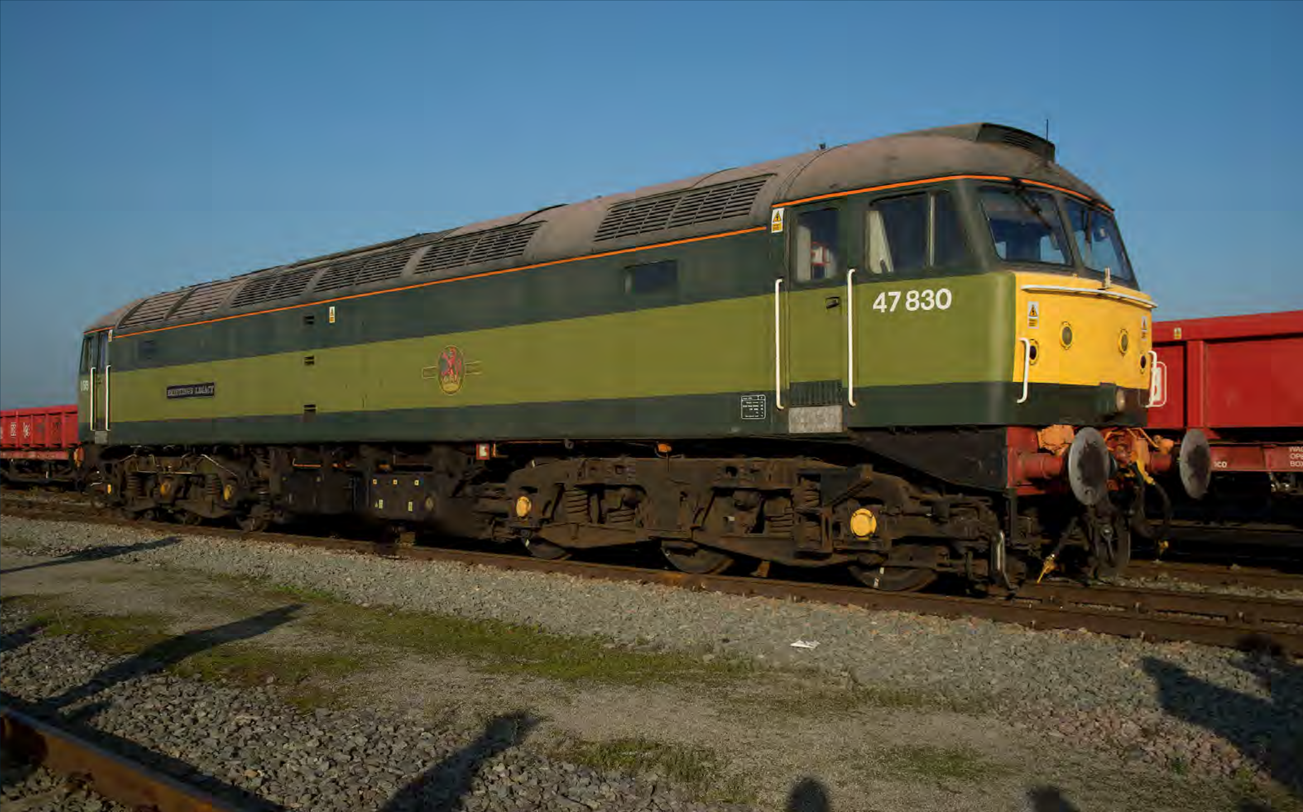
On November 17th, Class 47 830 is seen stabled at Crewe Basford Hall. Brian Battersby