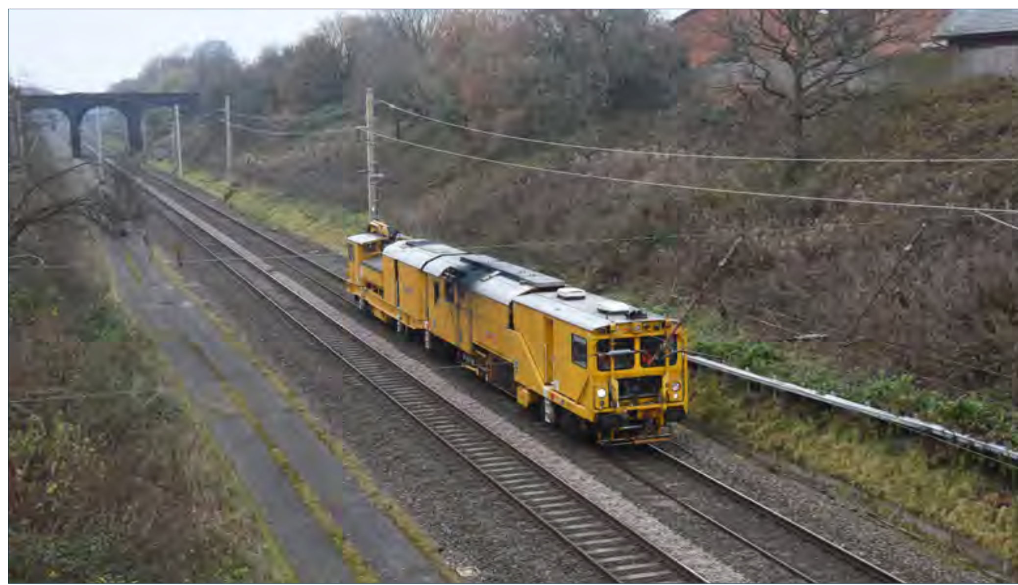
◀ A Network Rail Stoneblower heads along the West Coast main line at Charnock Richard on November 23rd.