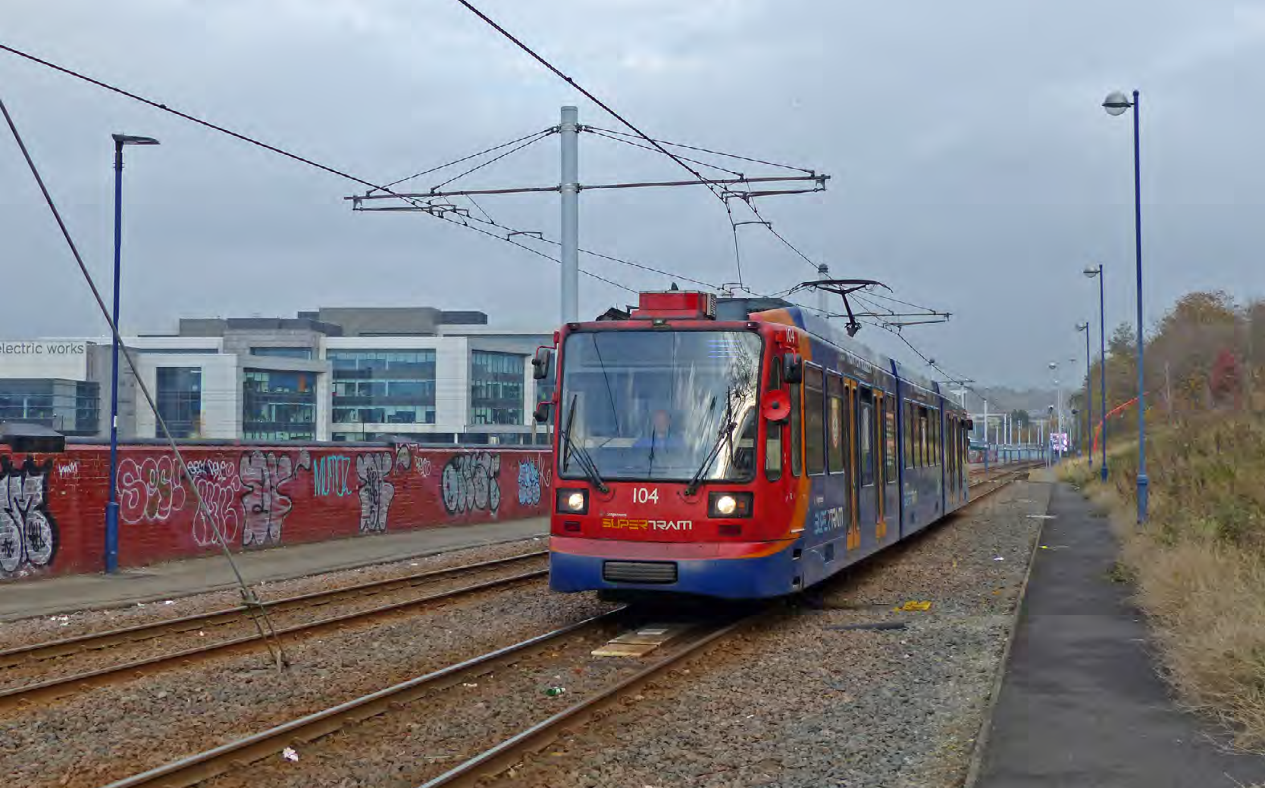
▶ Siemens/Duewag tram No. 104 approaches Sheffield Station stop en route to Halfway on November 6th. Michael Lynam