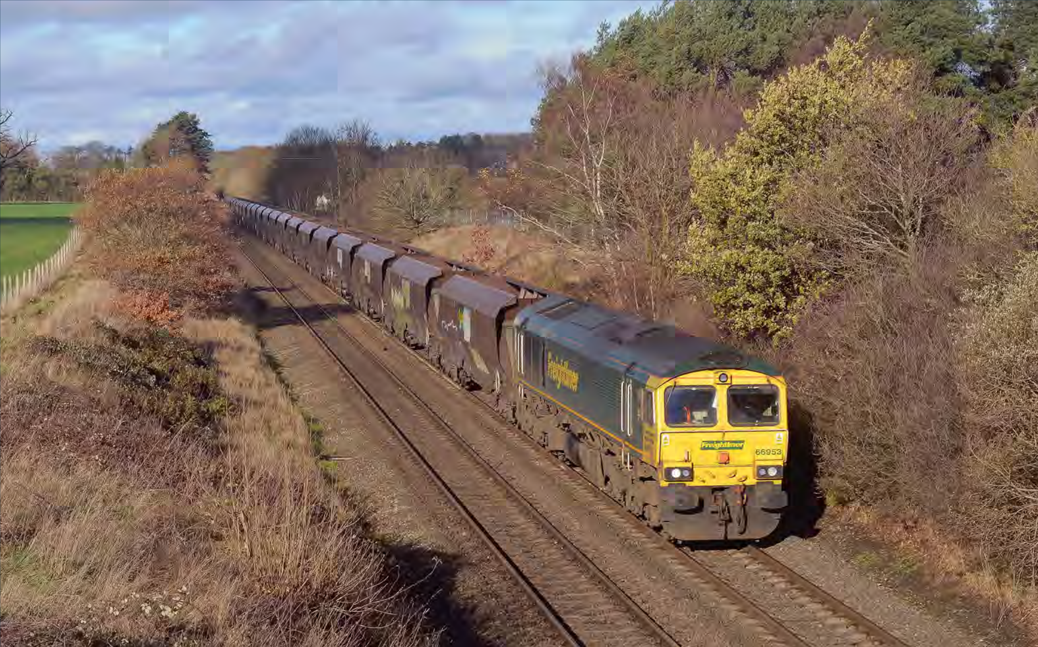
Class 66 953 is seen at Sansaw with the 4V22 09:30 Fiddlers Ferry power station - East Usk Yard on November 29th. Keith Davies