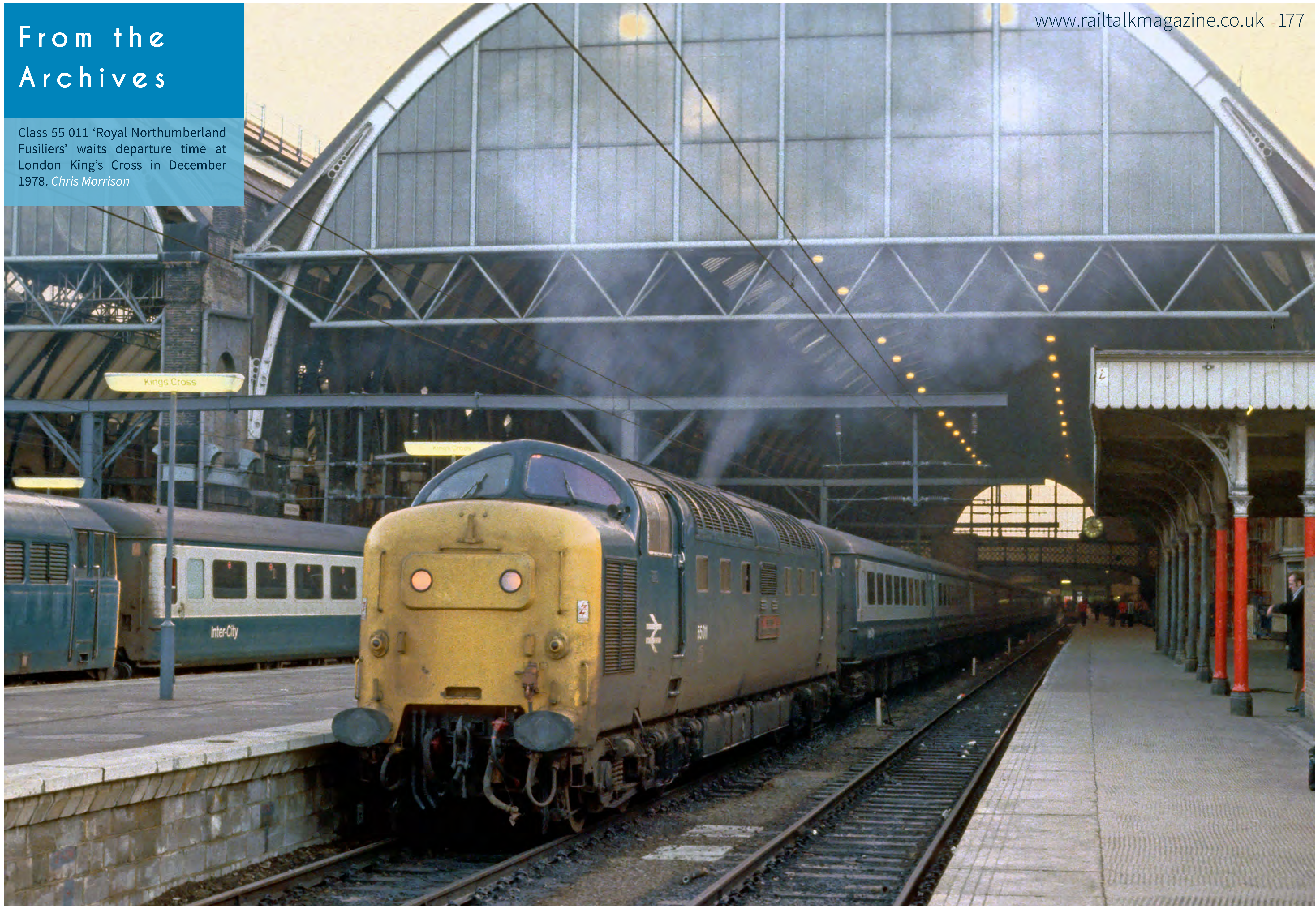
Class 55 011 'Royal Northumberland Fusiliers' waits departure time at London King's Cross in December 1978. Chris Morrison