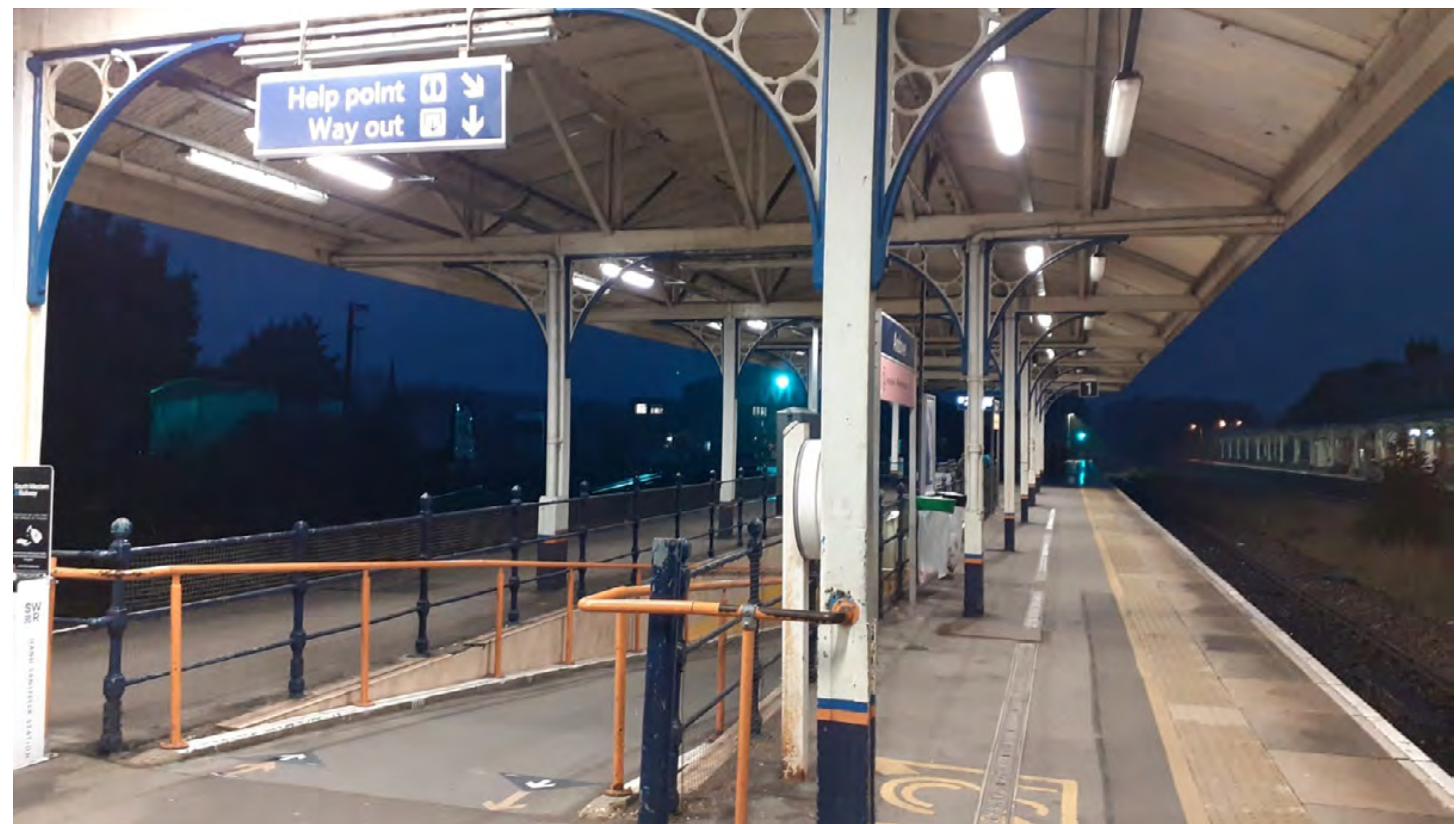
Photo: Andover station is the latest to be 'rewired' in energy efficiency upgrade programme by Network Rail and SWR.

On top of supporting the Rewire, Relight programme, we are also in the process of replacing the lighting at our stations – amounting to around 16,500 bulbs in total. This work, which is set to reduce energy consumption significantly, is currently on course to be completed by the end of the year".