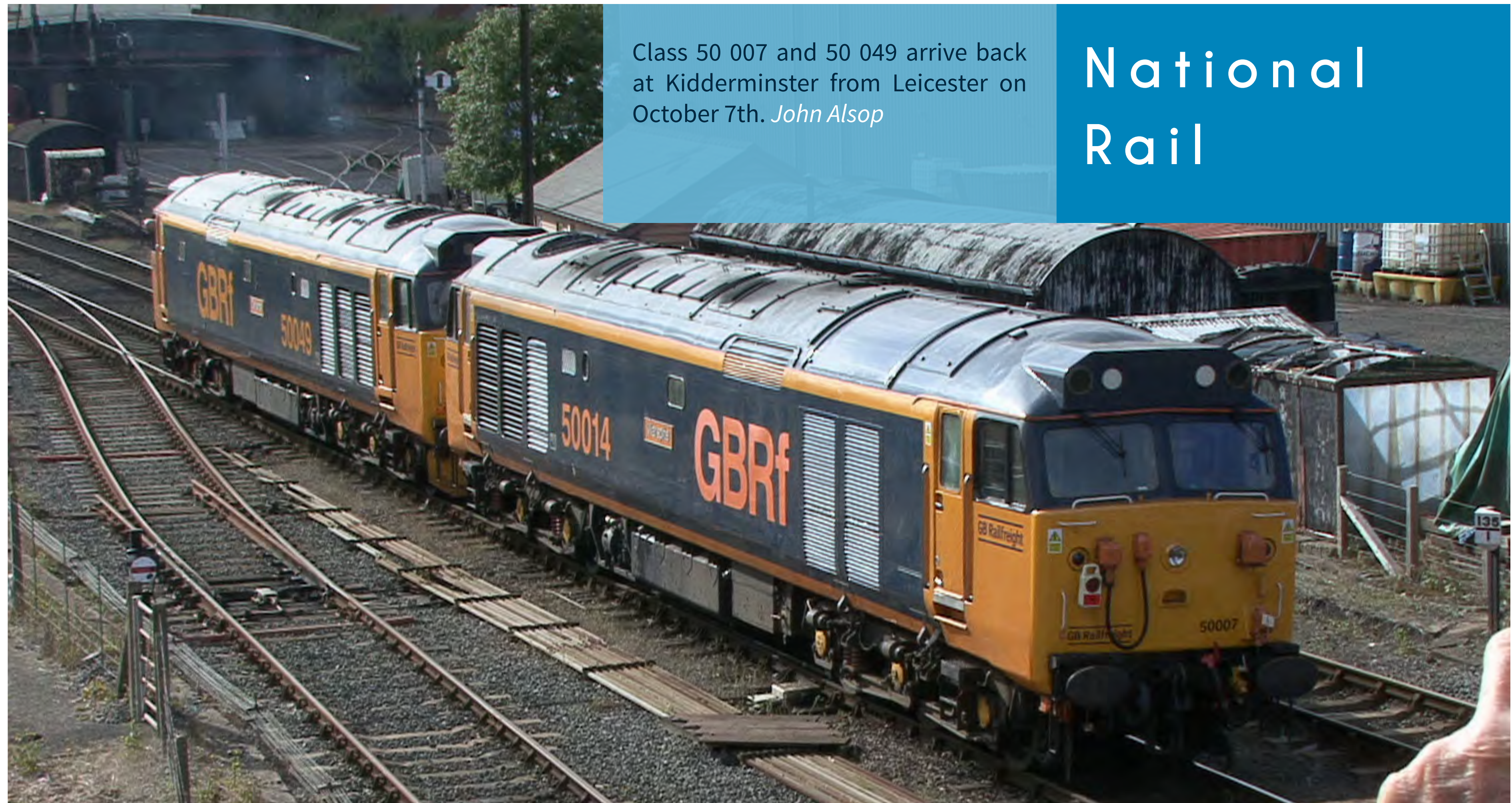
Class 50 007 and 50 049 arrive back at Kidderminster from Leicester on October 7th.