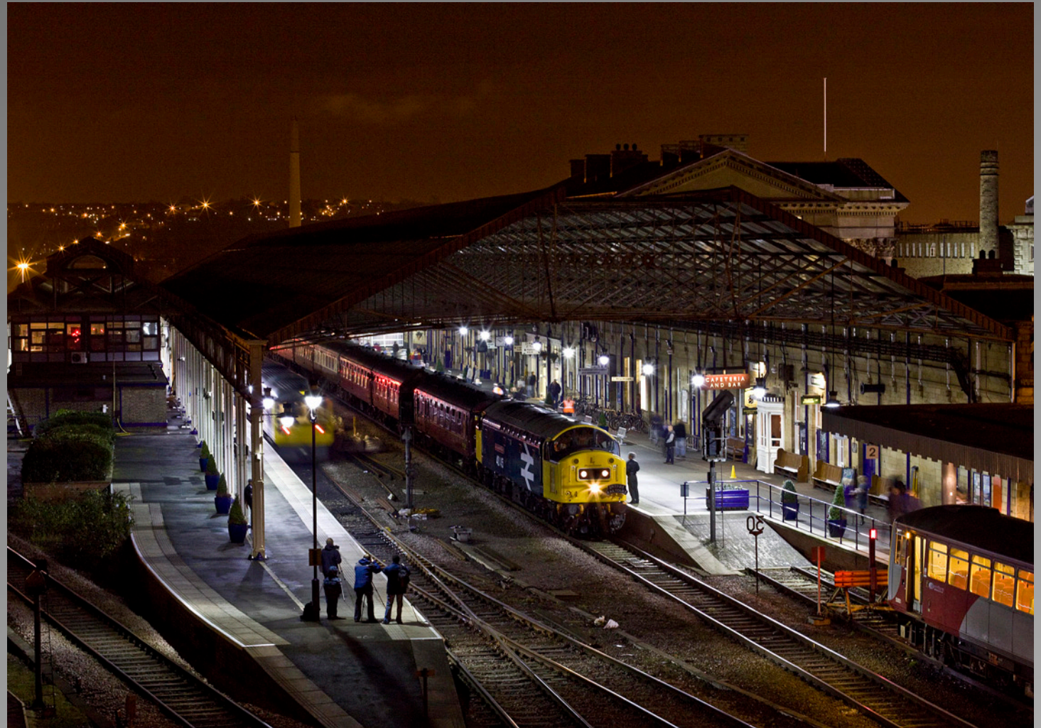
Above: On the 15th November Spitfire's "The Capital Whistler" ran from Preston - London King's Cross with Class 40 145. This picture was taken at Huddersfield on the return leg.