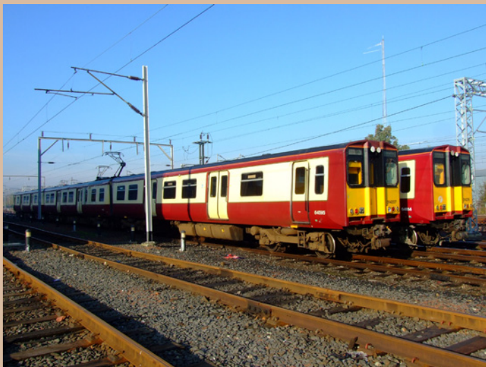
Above: Class 314 207 and Class 314 216 are both seen sitting outside in the yard at Shields.