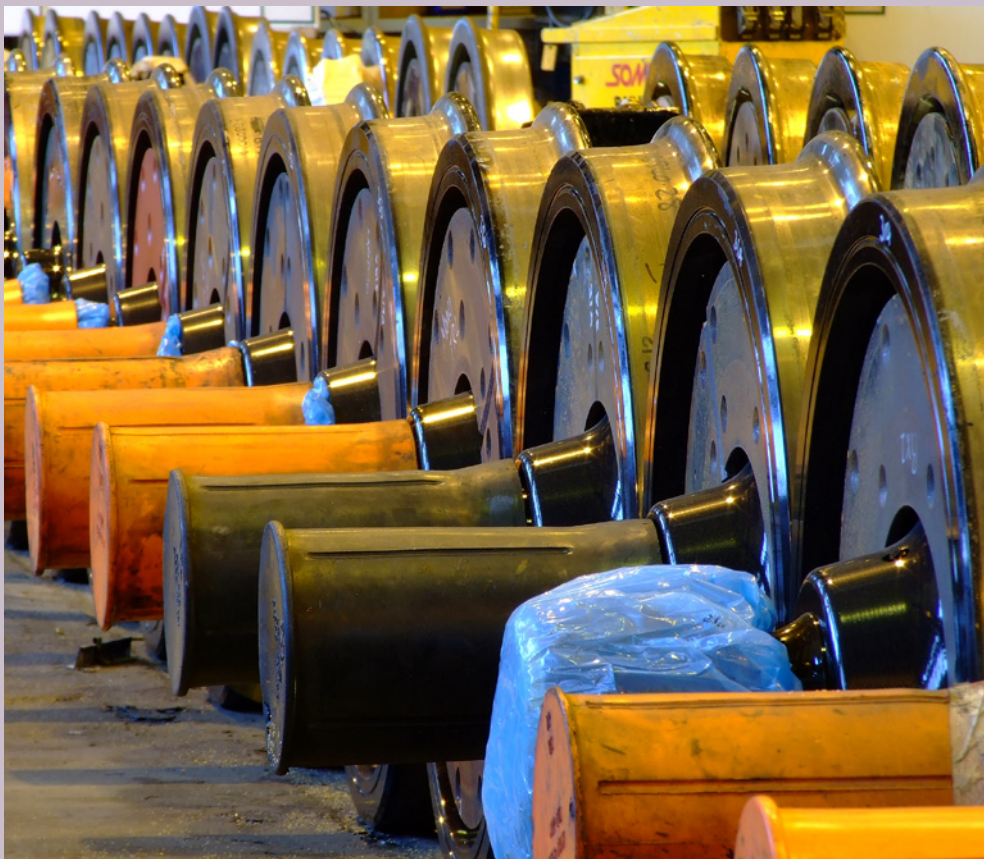
Top Left: A close up photograph inside the maintenance shed at Shields T.M.D. of Class 314, 318 and Class 320 BREL EMU and Class 334 EMU Alstom Juniper wheelsets. Some wheelsets old and ready for scrapping and some are brand new and waiting to be fitted to the Class 314, 318, 320 and 334 EMU fleet. Jonathan McGurk