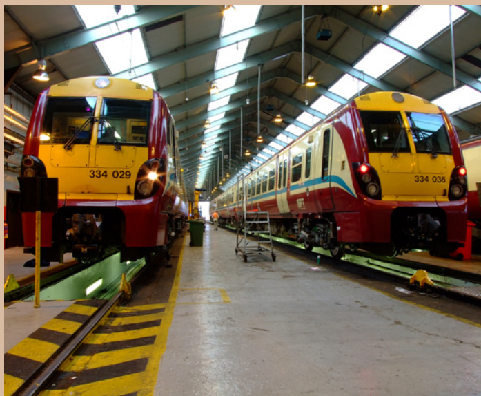
Below: Class 334 029 and Class 334 036 are both seen sitting inside the maintenance shed at Shields T.M.D. both of which are in the middle of going the C4 overhaul programme. As you can see the bogies and couplers have been fitted to both units.