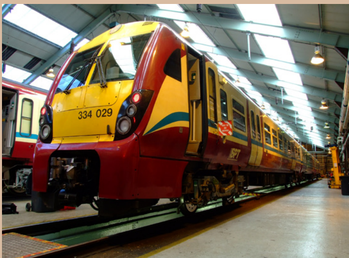
Above: Class 334 029 is seen sitting on number 11 road inside the maintenance shed at Shields, going through a few tests and exams. As you can see the unit has partly completed a C4 overhaul. The unit is one of three to have had the C4 overhaul done at the same time as another two Junipers (Class 334s numbers 031 and 036). The reason for this is because parts for the couplers have not arrived from Germany and Shields are just getting the C4 work that they are able to do for now complete on the Junipers done and getting it out the way and will come back to fitting the spare parts they are waiting for when they arrive.