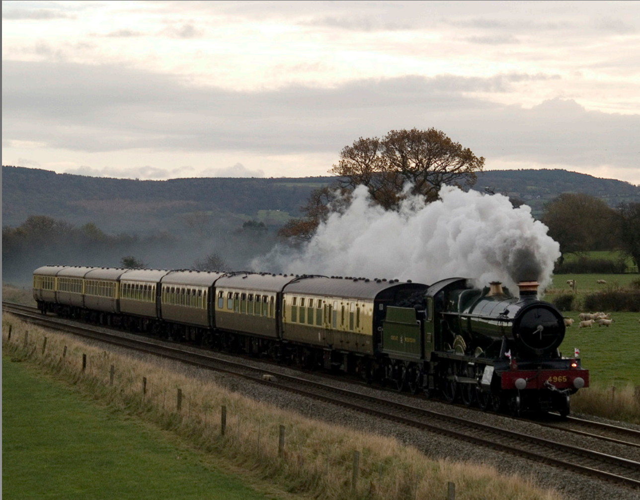
Above: On 22nd November Vintage Trains ran the "Rood Ashton Hall Farewell" railtour ran from Tyseley Warwick Rd - Chester and featured 4965.