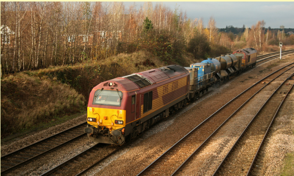
Top Left: Class 67 008 leading 67 001 at Finedon Station with 3J92 Toton - Cricklewood RHTT. These two locos took over this working from 67 029 and a DVT on 25th November. This shot was taken on 27th November.