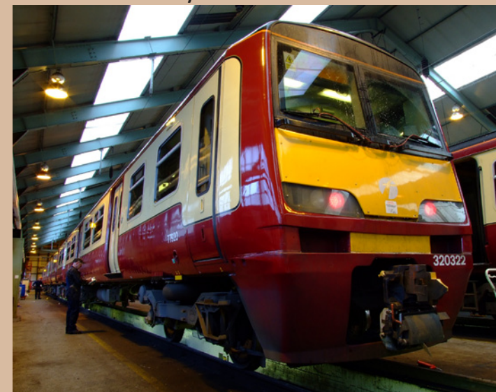
Above: Class 320 322 is seen on number 8 road inside the maintenance shed at Shields, going through some exams and tests.