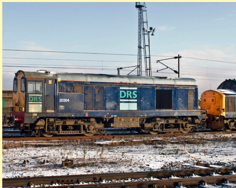
Top Right: Regular to the Yorkshire RHTT circuit is Class 20 304, seen here with Class 37 194 at York on the 23rd November.