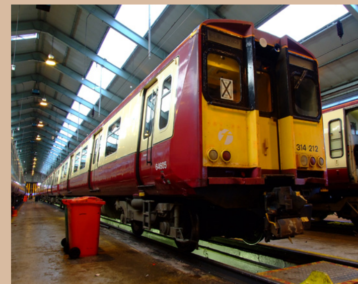
Above: Class 314 212 is seen sitting inside the maintenance shed at Shields.

Many thanks to all those who made this visit possible. A fantastic peek at one of the busiest depots on Scotland.