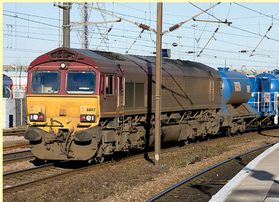
Bottom Right: EWS Class 66 147 passes through Doncaster on the 22nd November with the South Yorkshire RHTT.