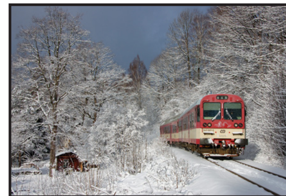
Front Cover: Winter, Czech Republic style! Class 943 007-5 and 843 008-4 are working Smržovka dolní nádraží - Tanvald zastávka on the 22nd November.

If you want to receive Railtalk Magazine as soon as it is published, you can subscribe to our mailing list, all you have to do is visit the contact us page on the website, and enter your email address.