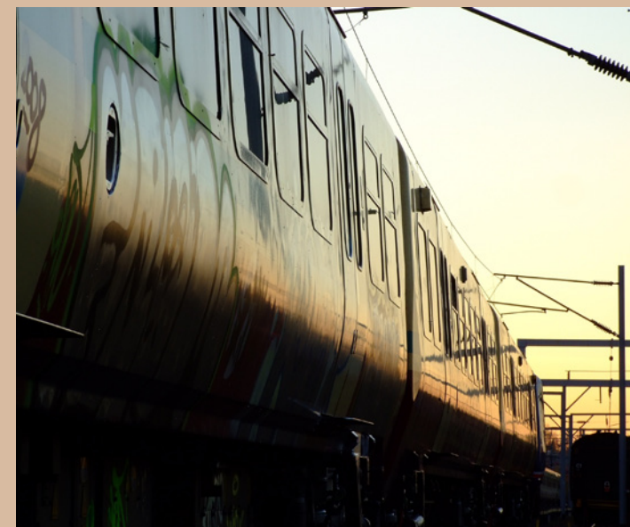
Above: A photograph of the sun setting in the yard at Shields and of one side of B end (coach 65131) of Class 334 031 that was attacked with spray paint by young vandals during my visit to the depot. The train is seen sitting inside number 5 road in the yard in Shields T.M.D