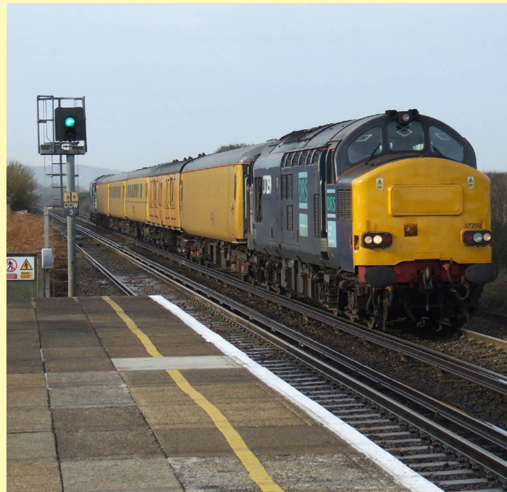
Top Right: Class 37 259 and 37 606 pass Cooden Beach station, on the Hastings - Eastbourne line, while working 1Q14 Brighton Lovers Walk-Hither Green SERCO test train on 13th November. Craig Stretten