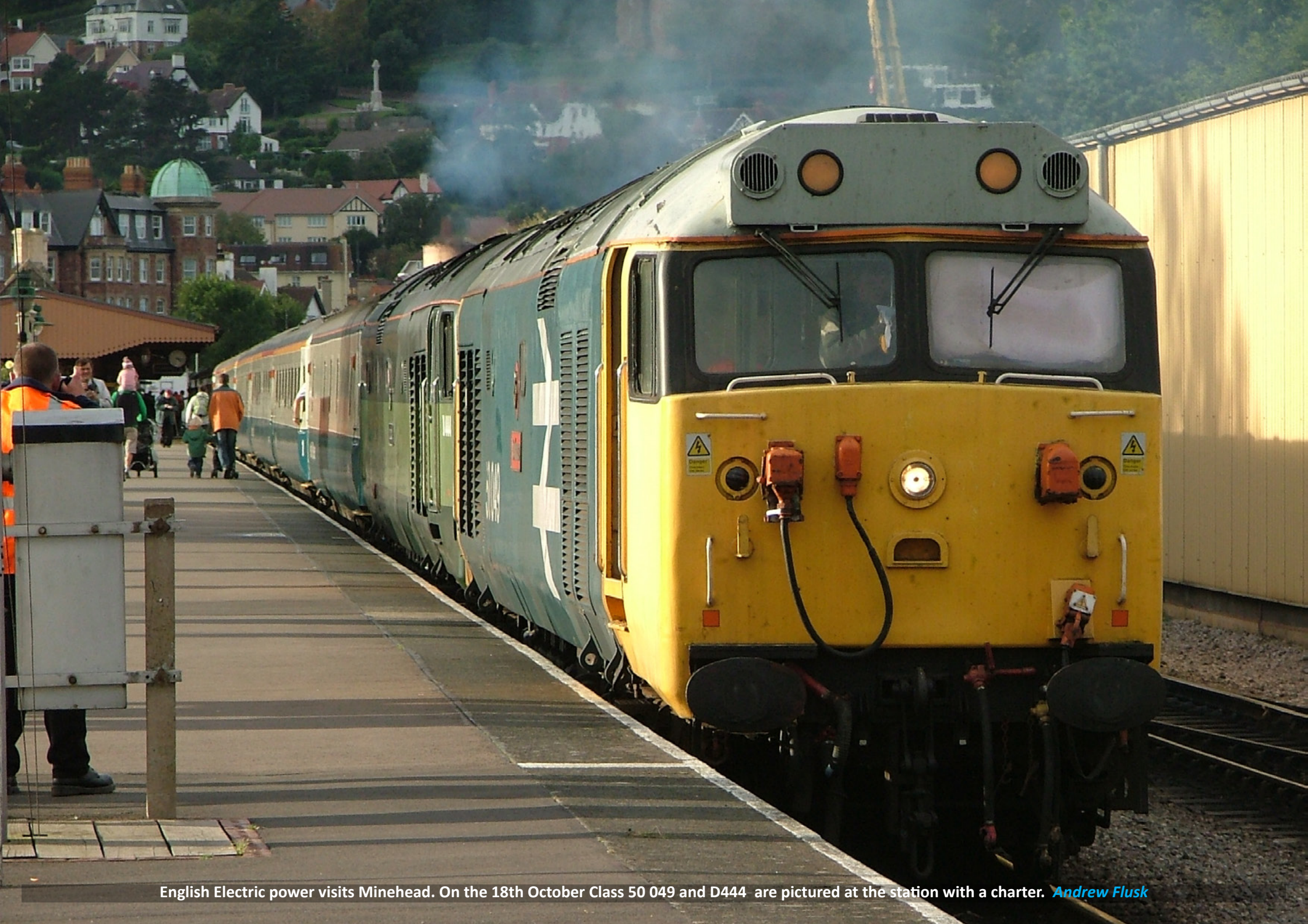
English Electric power visits Minehead. On the 18th October Class 50 049 and D444 are pictured at the station with a charter.