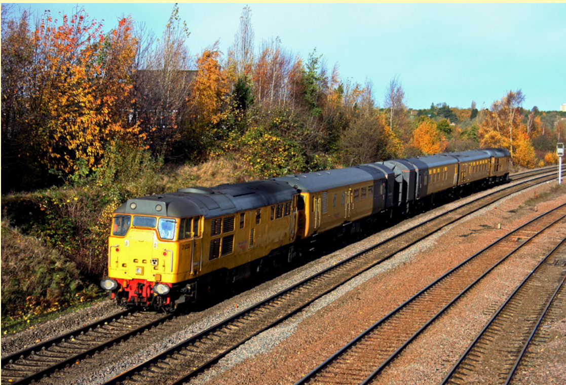
Above: Class 31 233 is at the rear of the Serco Test train working 1Q07 Kentish Town to Derby RTC passed Kettering South on 9th November. Class 31 602 was leading the train.