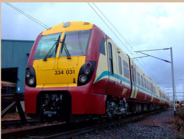
Above: Class 334 031 is seen sitting outside in the yard at Shields T.M.D. awaiting to go through the final tests and exams a C4 overhaul the set received inside the maintenance shed in October. The set was inside the maintenance shed for two weeks in order to complete the C4 overhaul (apart from the tests and exams). A C4 overhaul consists of a set having new bogies, new couplers and a renew of everything underneath the train. Class 334 031 got released from the shed and out into the yard on Friday 31st October and should

go back out in traffic on Monday 10th November if the set passes the final tests and exams which will be getting carried out during the night on Sunday 9th November 2008