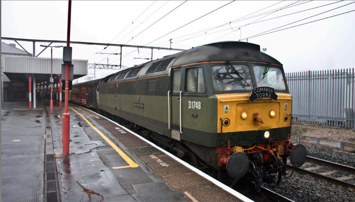
Above: Compass Tours "The Festive Shakesperian" ran on the 29th November from Liverpool South Parkway - Stratford-upon-Avon with Riveria's Class 47 805 and 47 815. This is Class 47 815 on the outward journey at Stockport.