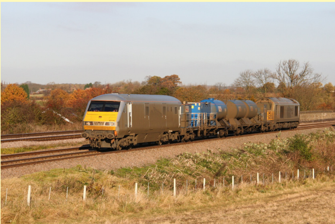
Top Left: The not so clean silver skip and DVT are seen passing High Bridge, Oakley with 3J92 Toton - Cricklewood on 12th November. 82146 is leading Class 67 029 'Royal Diamond' which is normally on the south end of this train, but the train was turned on Wigston loop earlier in the day. Steve Madden