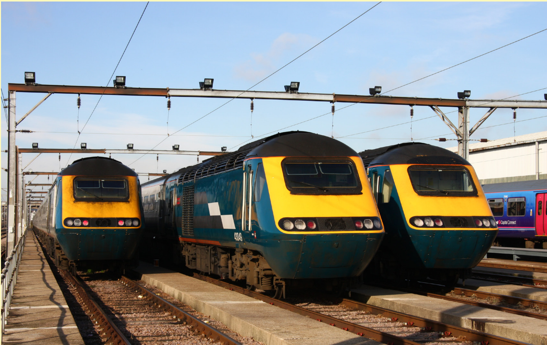
Above: A shot of 3 HST sets stabled at Cricklewood Carriage Sidings on 14th November. These sets are stabled here all day and are used for evening peak services out of St Pancras International. Steve Madden