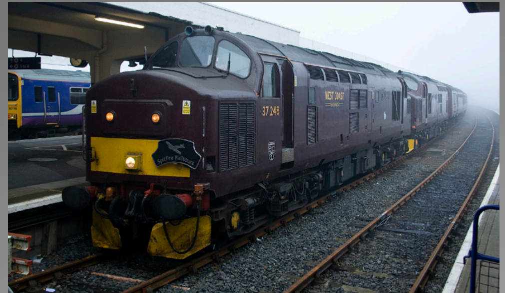
The other major Class 37 tour this month was Spitfire's festive "Christmas Cracker" from Poole - Blackpool North on the 29th November. Above: On arrival at foggy Blackpool, West Coast's Class 37 248 and 37 676 await the signal to reverse the stock out of the station. Richard Hargreaves Below: Seen on arrival back at Manchester Victoria, now with Class 37 676 leading, the pair are ready to depart back to Poole. Class47