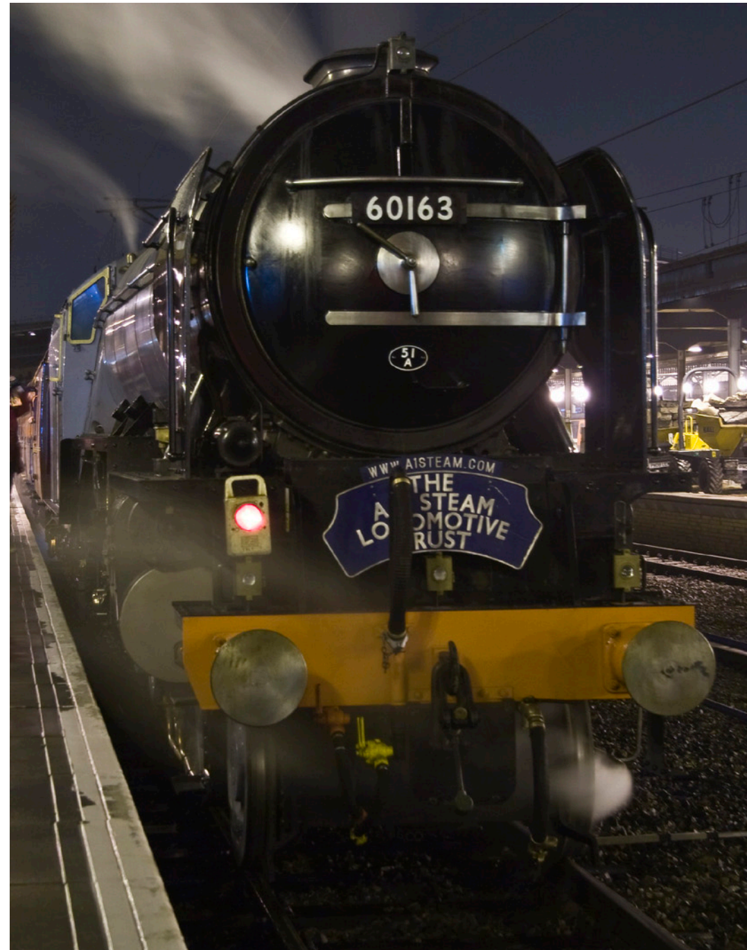
Tornado waits at York before a mainline test run to Barrow Hill.

"The Trust is grateful for National Express's sponsorship of Tornado's final test run. Not only does it demonstrate our links with today's railway industry but it will help the Trust in its operation of the locomotive. Tornado completing her main line trials is the end of another chapter in the story of a project that many said could never be completed. In 1990 a group was formed with a vision and the determination to make it succeed – to build and operate a Peppercorn class A1 Pacific steam locomotive for main line and preserved railway use. 18 years later, and thanks to that shared vision and determination, Tornado turned her wheels in anger for the first time on 1st August 2008 in front of the world's press. It is thanks to our more than 2,000 regular monthly and other donors, our sponsors led by William Cook Cast Products Limited and the hard work of our volunteers and contractors that all that remains now between Tornado and main line operations is the successful completion of this test. The Trust is now looking to the great British public to help us get Tornado in to main line passenger service by making a donation, sponsoring a component, taking part in our covenant scheme and/or our £500,000 bond issue. There is now only 10 weeks until Tornado's main line passenger debut."