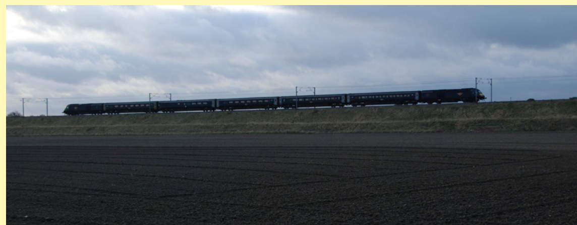
Bottom Right: A Grand Central HST passes Little Heck at full speed heading for London, late in the afternoon of 19th November. David Hollowood