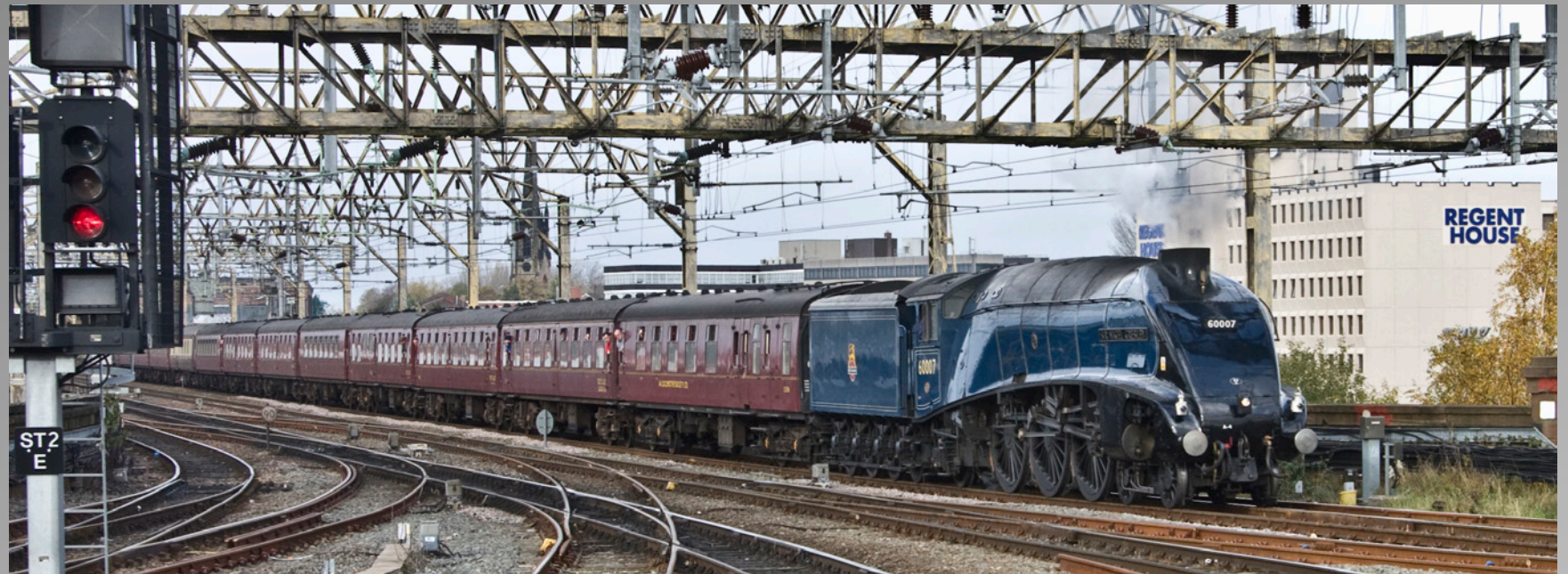
Left: "The Cheshireman" from Scarborough - Chester on the 8th November featured 60007 from Scarborough to Crewe. In this shot the A4 is seen crossing the viaduct at Stockport. Class47