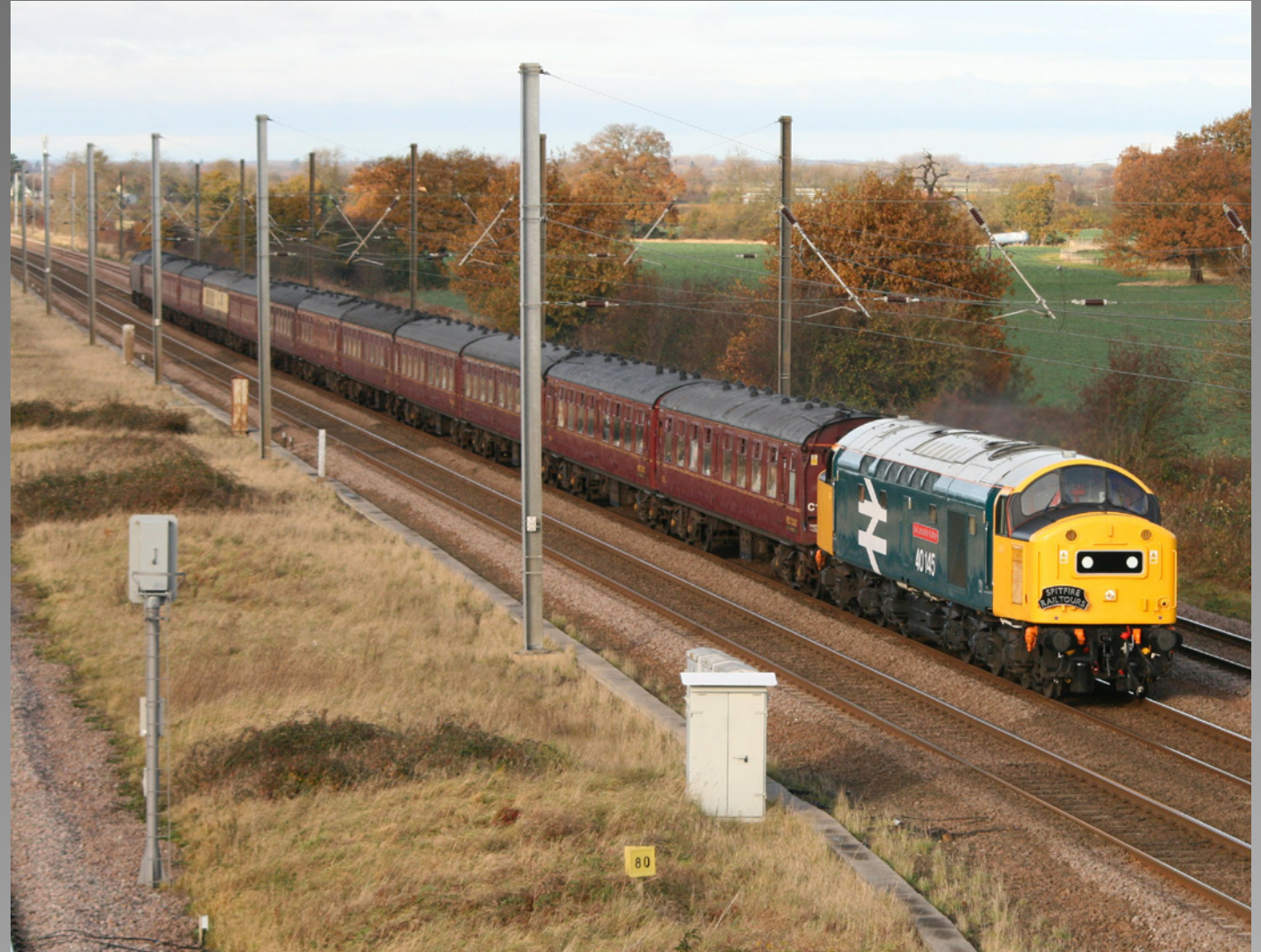
Above: Further down the East Coast main line Class 40 145 'East Lancashire Railway' passes Marholm, near Peterborough working 1Z55 Preston to Kings Cross on 15th November.