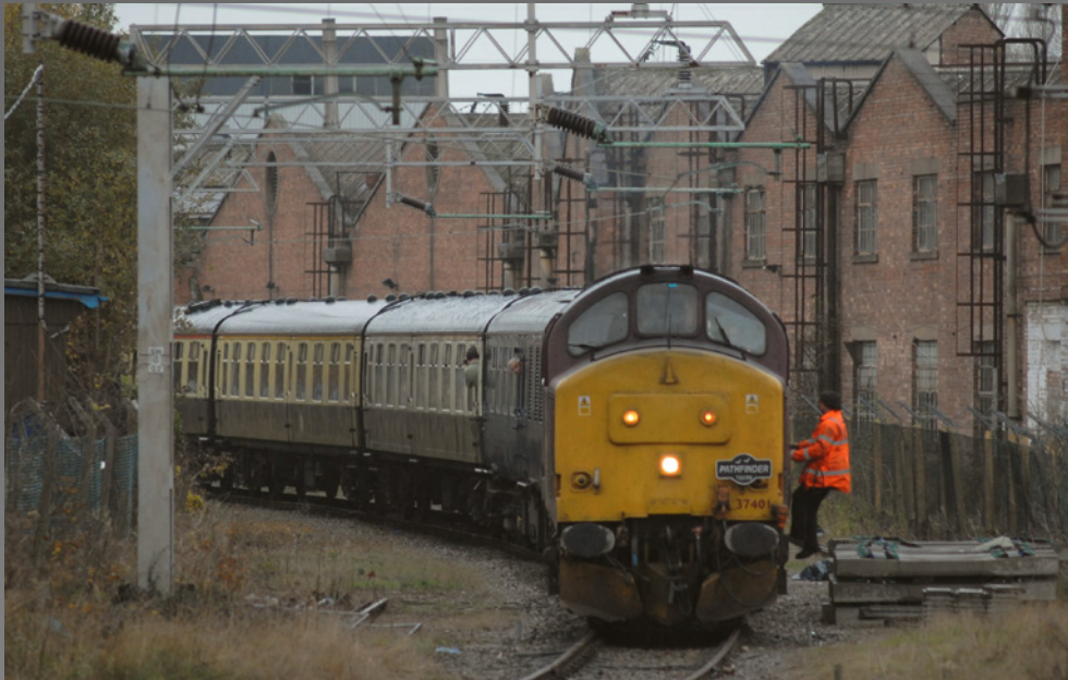
Above: On a wet Saturday afternoon, on 15th November, Class 37 401 prepares to take the 1274 Round Oak - Reading off the stub of the old Wellington line at Stafford. 37417 was now at the other end of the train. Below: Now with 401 on the rear Class 37 417 is pictured passing Tilehill.