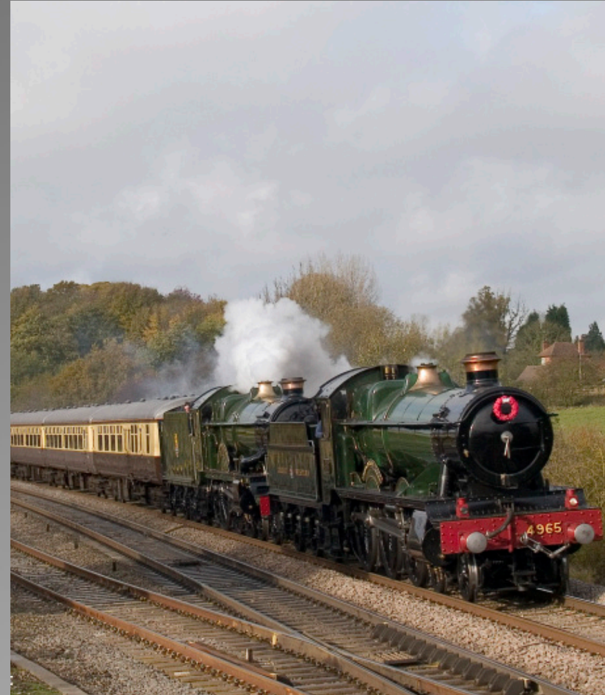
Above: "Great Western Echoes" ran on the 8th November from Solihull - Didcot and featured 4965 and 5043.

This was the inaugural working of 5043 following overhaul.