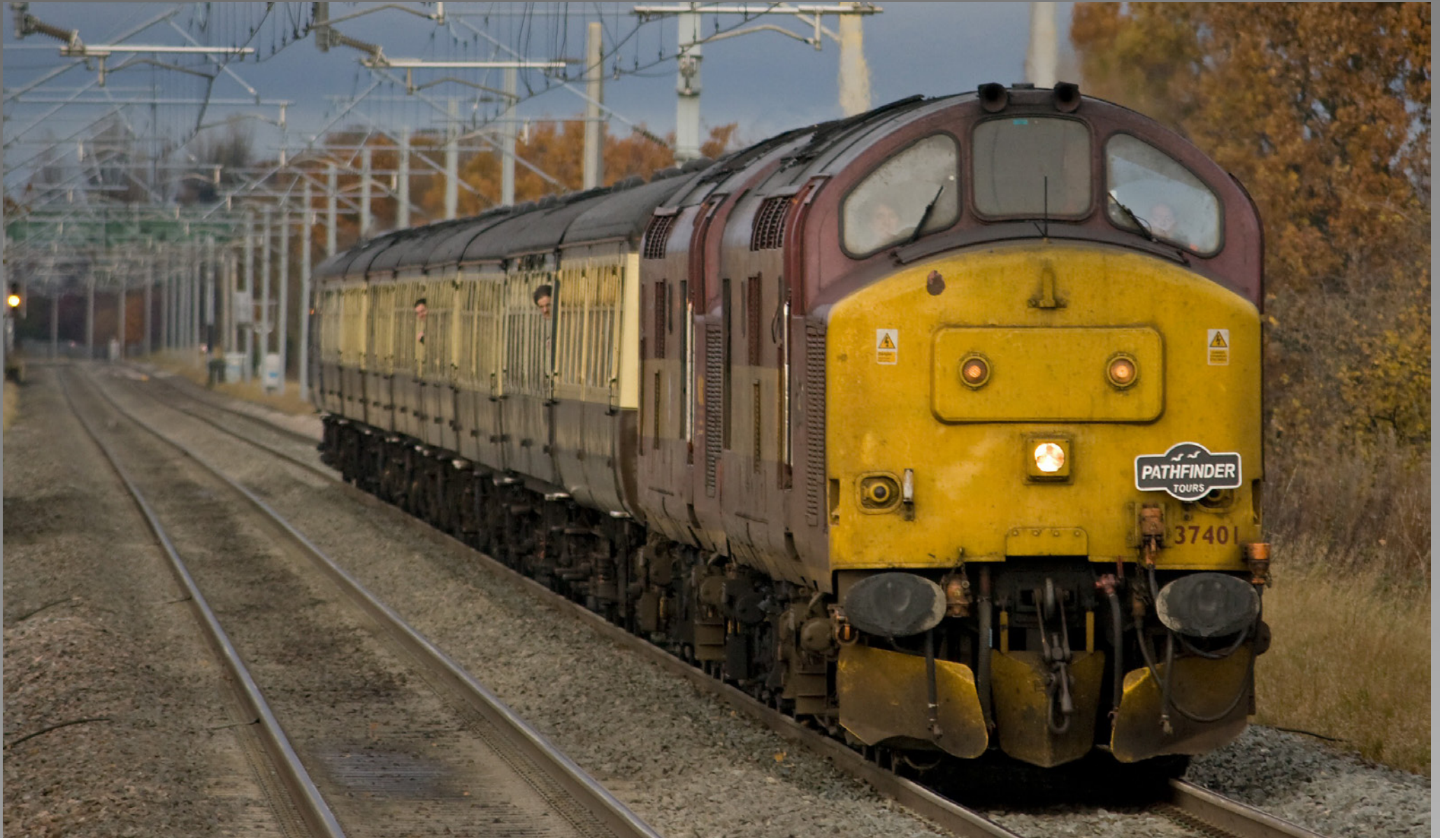
Above: Pathfinders "The Industrious Trader" on the 15th November ran from Reading - Round Oak via various branch lines. This is shot of Class 37 401 leading 37 417 passed Marston Green