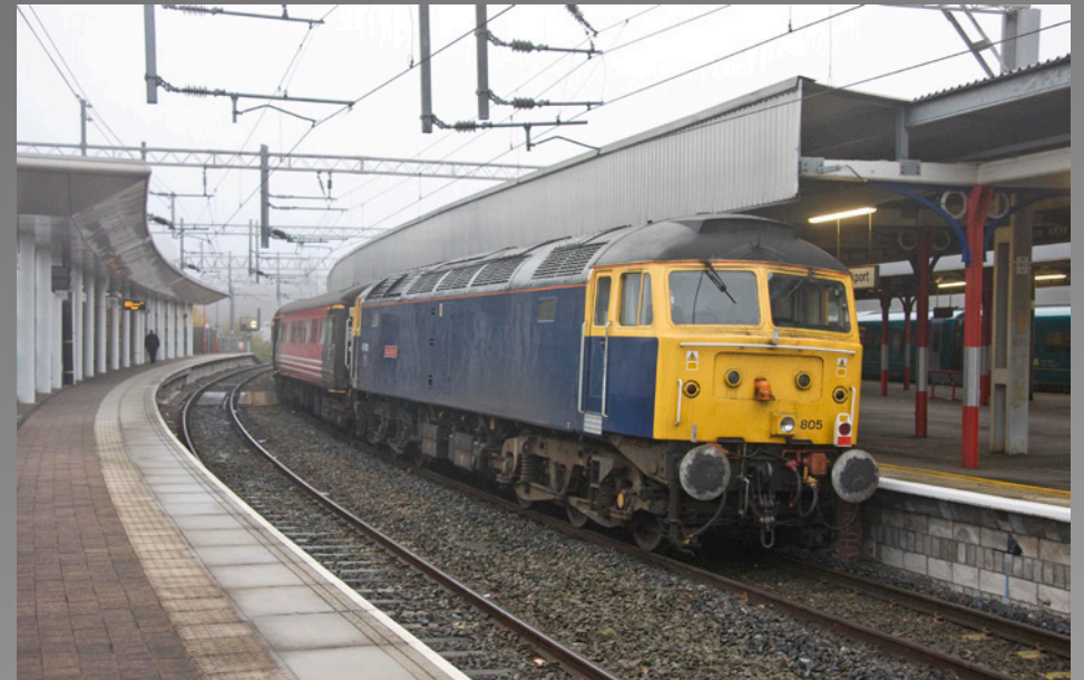
Above: Class 47 805 is seen on the rear of Compass Tours "The Festive Shakesperian" on the 29th November. Class47