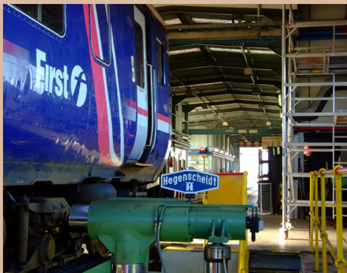
Above: Another shot of Class 156 476 (52476 end) seen inside the wheel lathe shed at Shields having its wheels turned.