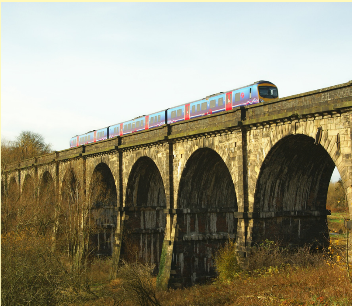
Top Left: The impressive and rather significant Sankey Viaduct or as its locally known the Nine Arches at Earlestown on the Liverpool - Manchester line with a diverted Class 185 heading towards Liverpool.