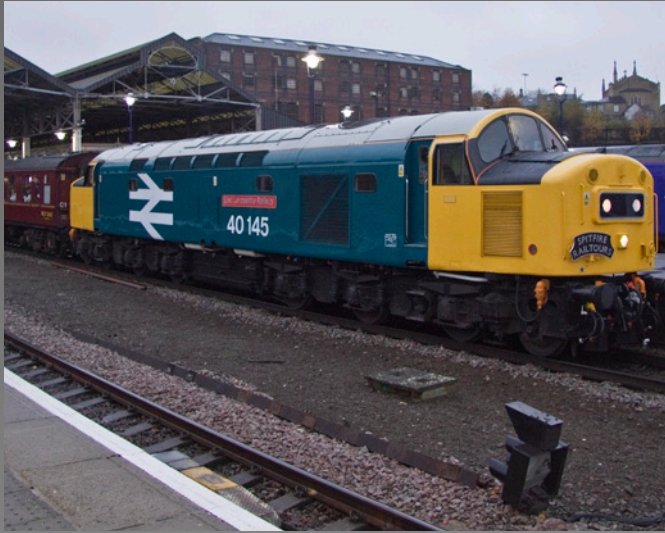
Above: Early on the morning of the 15th November Class 40 145 pauses at Huddesfield whilst working Spitfire's "Capital Whistler" tour from Preston to London Kings Cross. Class47