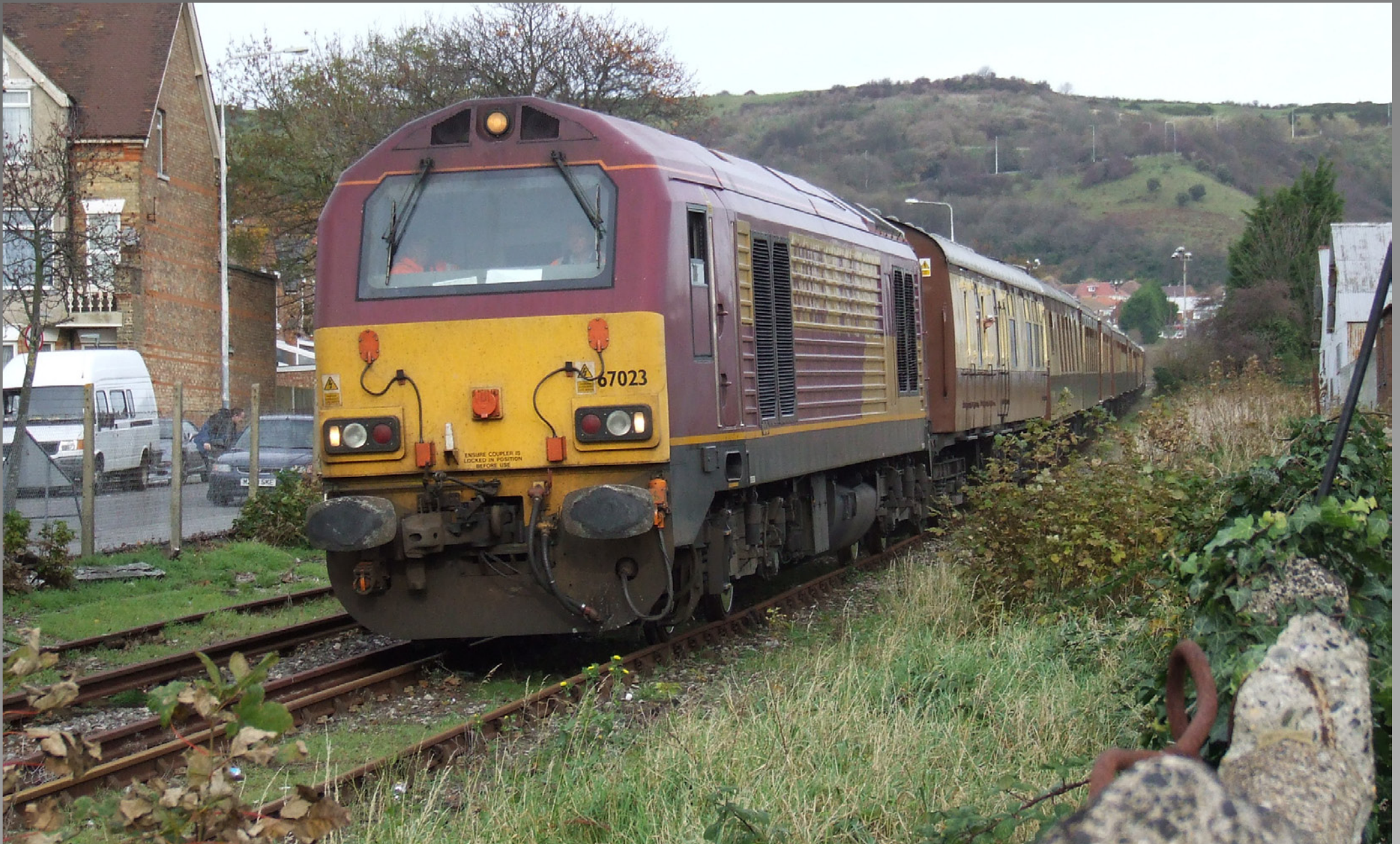
Above: Class 67 023 leads the last Folkestone Harbour VSOE of 2008 down the 1 in 30 bank that links Folkestone Harbour with Folkestone East Sidings and the mainline on 13th November. Craig Stretten