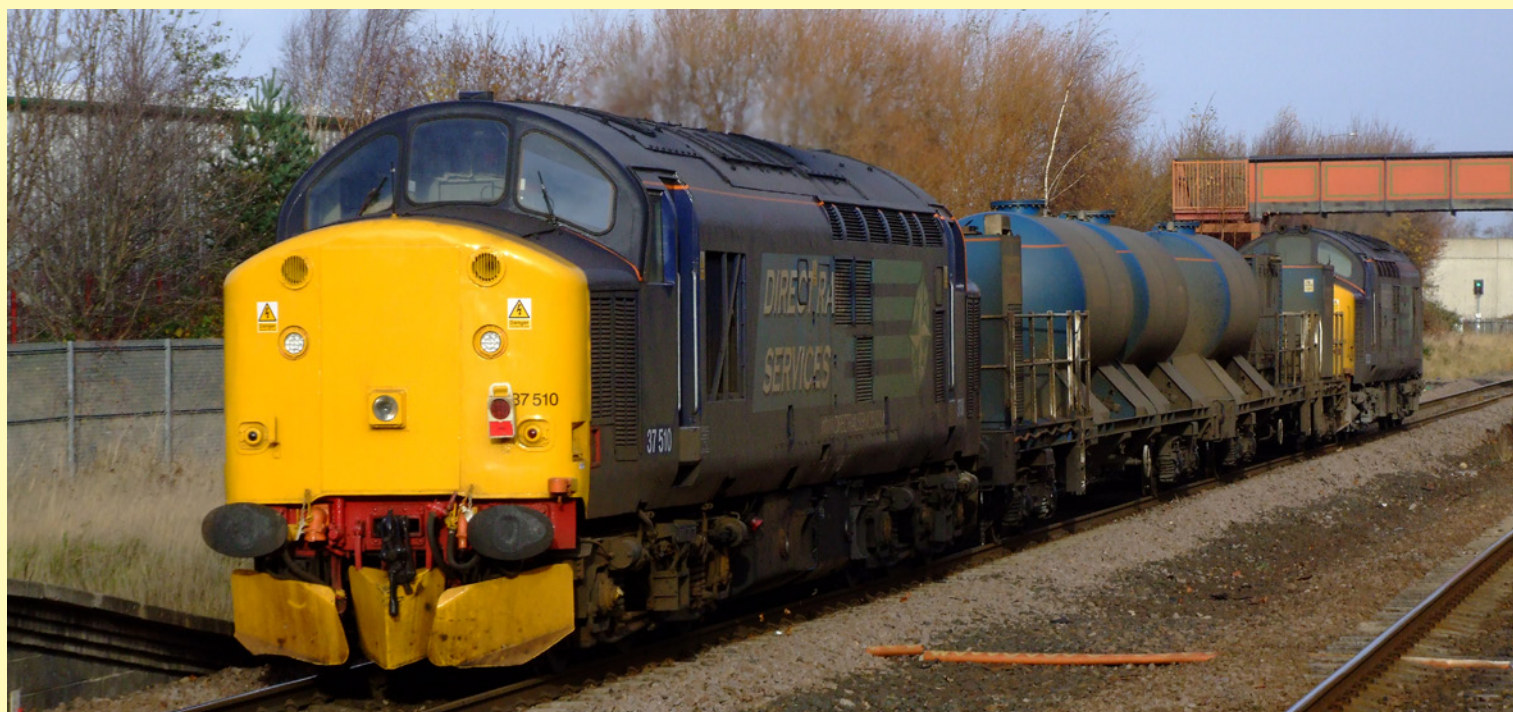
Right: Class 37 510 and 37 229 are seen passing Stockton on 3S10 Carlisle - Carlisle on the 20th November.