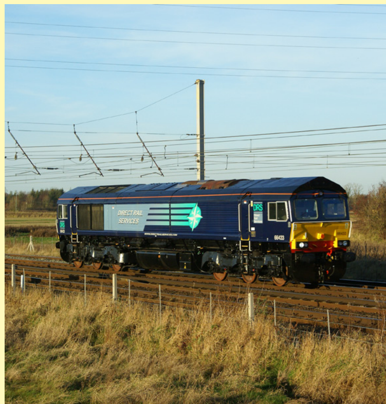
Right: Class 66 433 heads south light engine through Winwick Jct on 25th November.