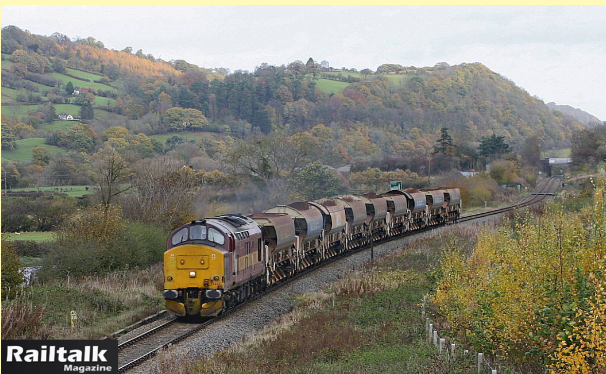
Below: Class 37 676 "Loch Rannoch" makes its return with a test run from Carnforth to Hellfield on 12th November for West Coast Railways. Ian Furness