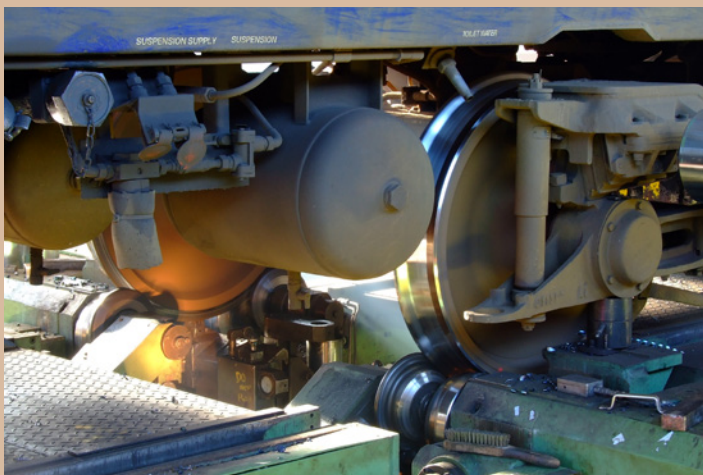
Below: One wheelset from Class 156 453 is seen being turned using the wheel lathe turning facility at Shields.