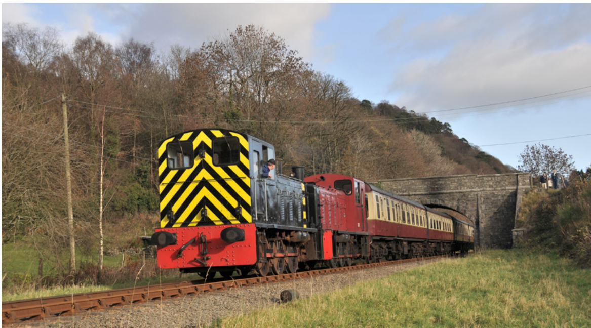
Lakeside & Haverthwaite Railway's Gala

Above: Class 03 072 and D2117 pass Newby Bridge on the 16th November. Ian Furness Below: Class 20 214 and Class 27 024 make a great sight passing Newby Bridge. Ian Furness