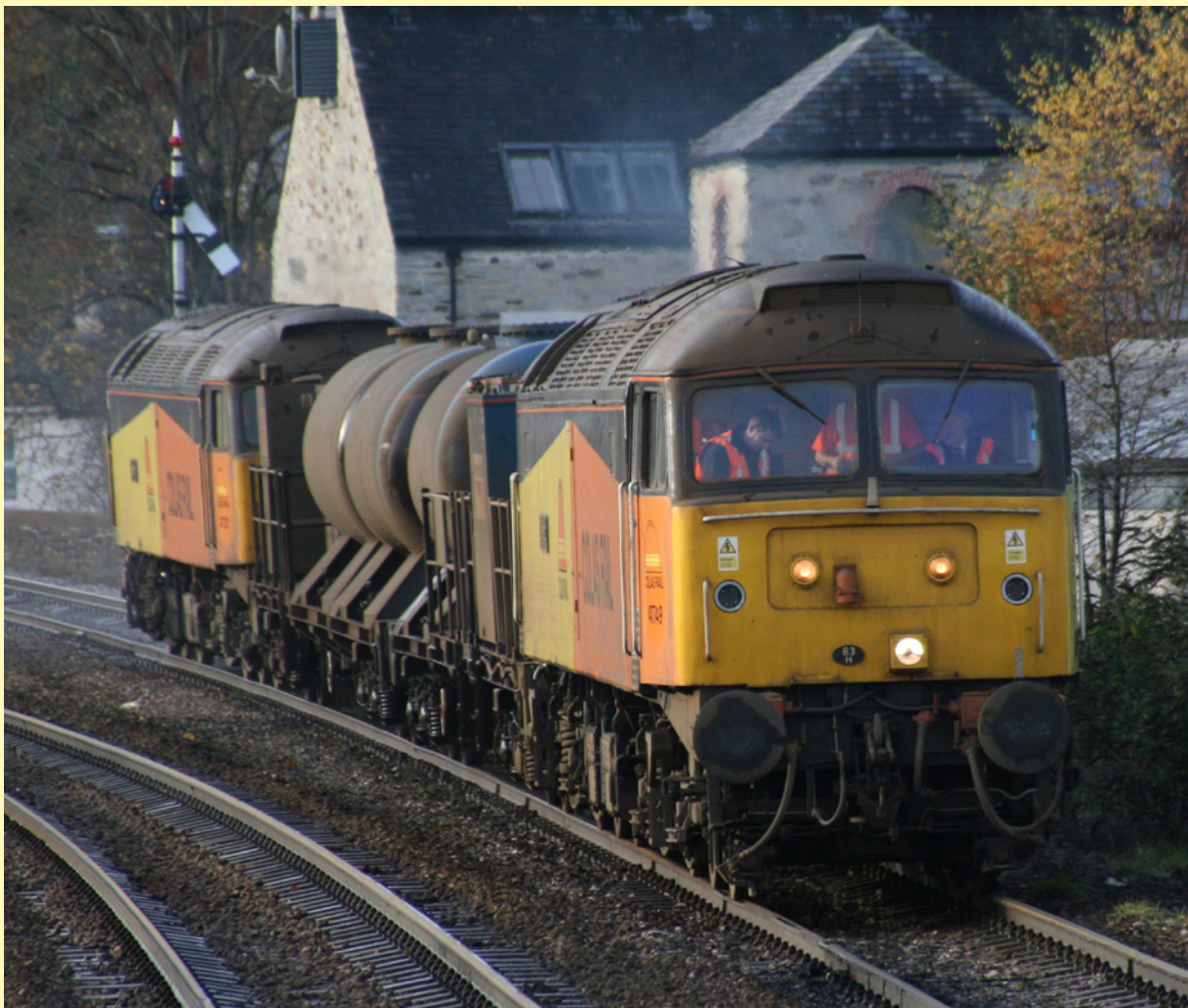
Above: The South West has been a regular sight for the Colas operated RHTT in recent weeks. In this shot we see Class 47 749 and 47 727 working the 3S11 Par - Par via Paignton at Lostwithiel on 16th November.