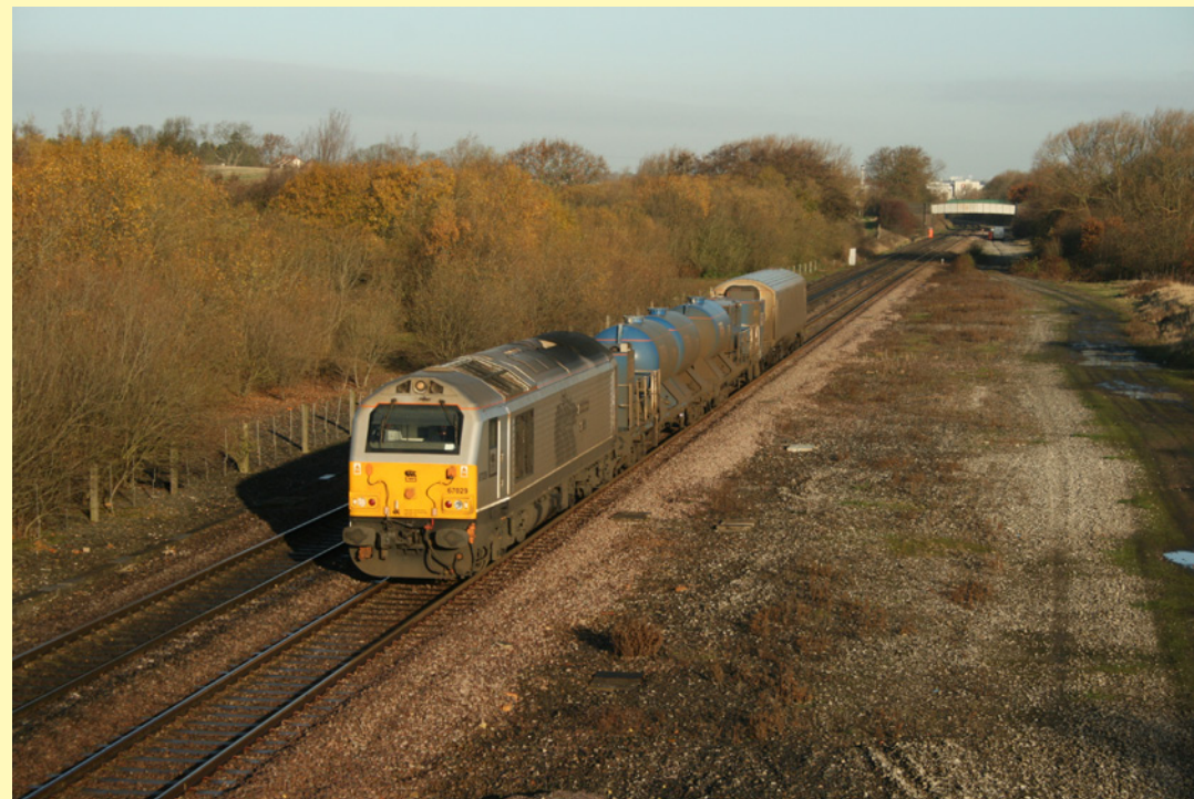
Top Right: Class 67029 with DVT 82146 Working 3J92 Toton to Cricklewood RHTT at Finedon Station. This was taken on 19th November and was one of the last workings of this train by this pair because there were required for an EWS Managers special the following week.