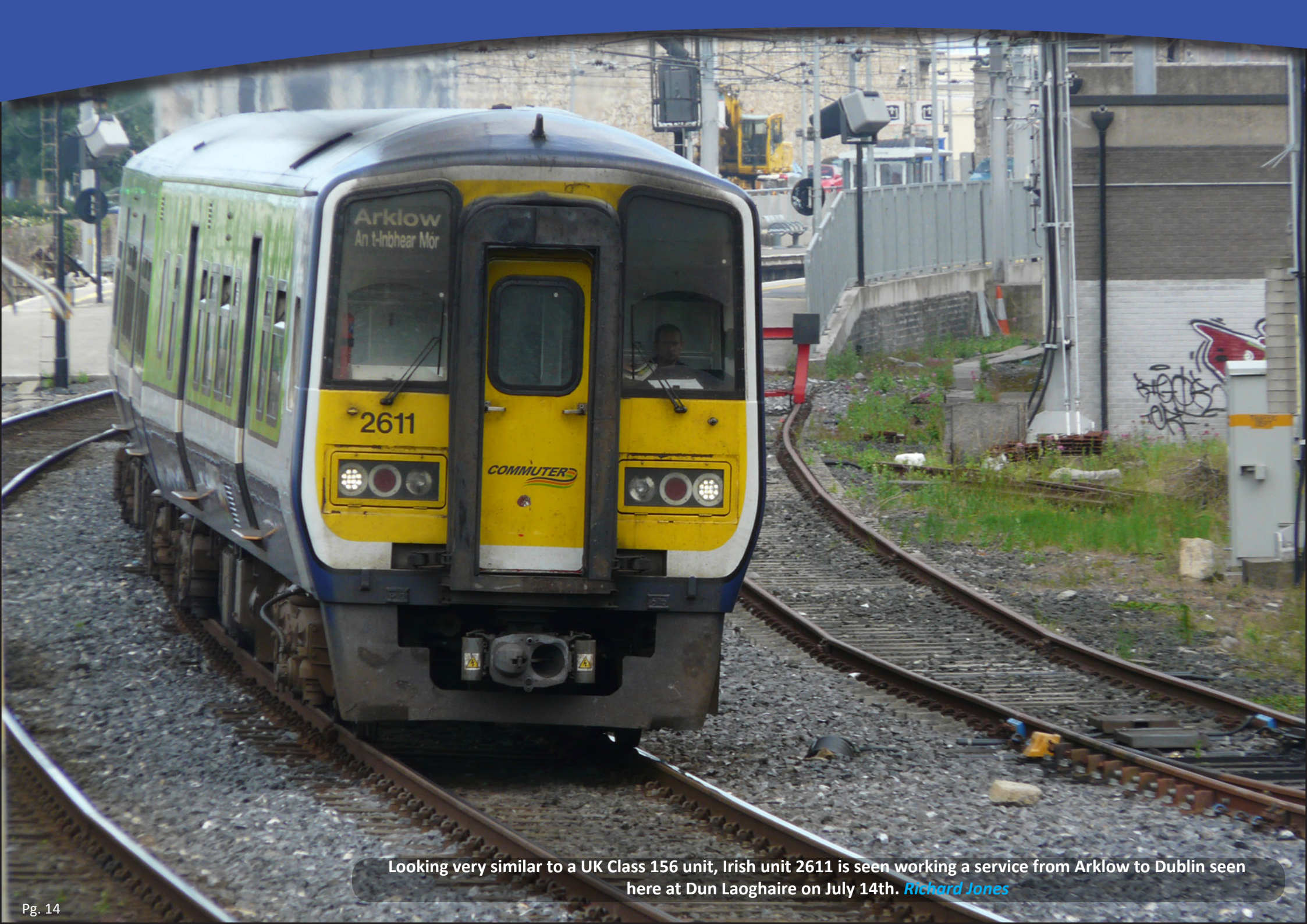
Looking very similar to a UK Class 156 unit, Irish unit 2611 is seen working a service from Arklow to Dublin seen here at Dun Laoghaire on July 14th.