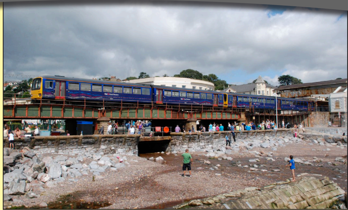
Above: Class 150 234 is seen at Newton Abbott working 2T20 Exmouth - Paignton.