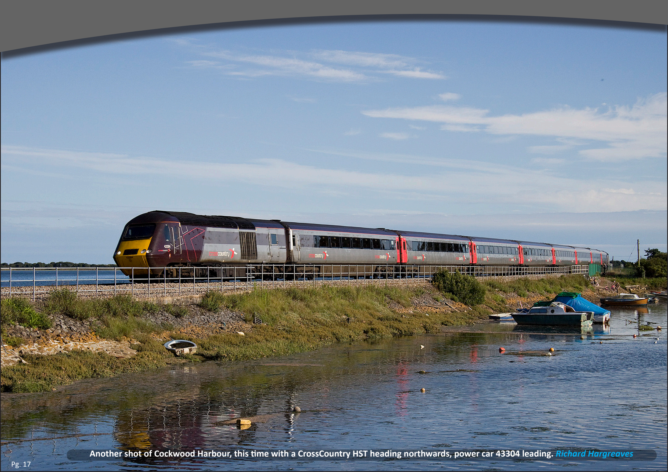
Another shot of Cockwood Harbour, this time with a CrossCountry HST heading northwards, power car 43304 leading.