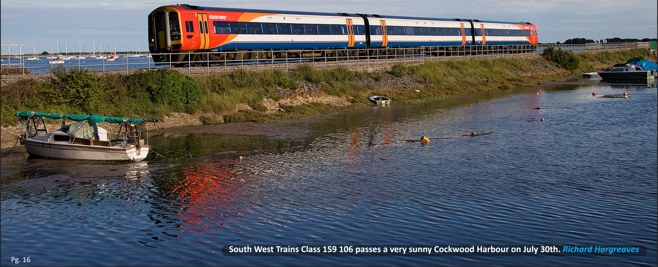
South West Trains Class 159 106 passes a very sunny Cockwood Harbour on July 30th.