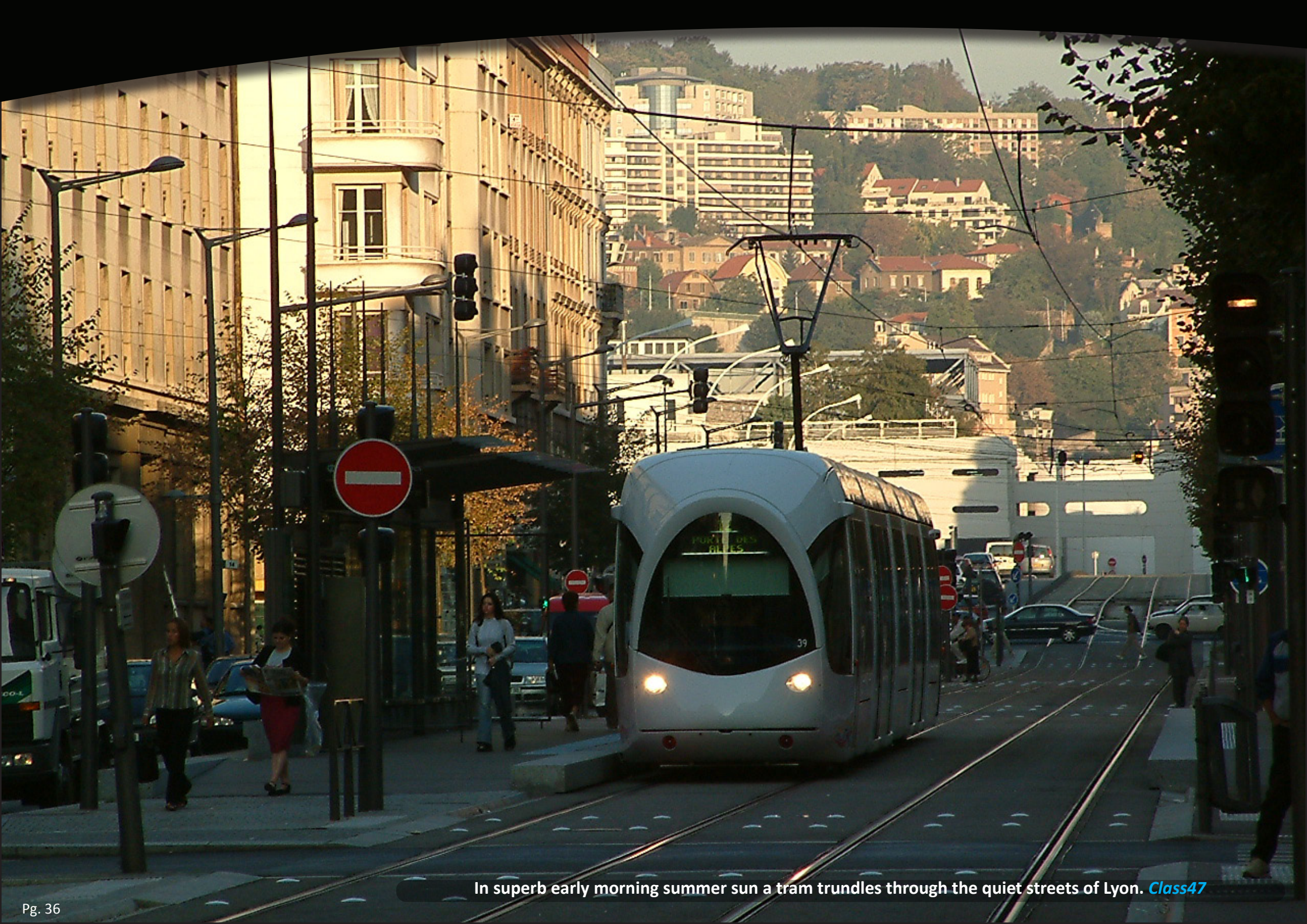
In superb early morning summer sun a tram trundles through the quiet streets of Lyon. Class47