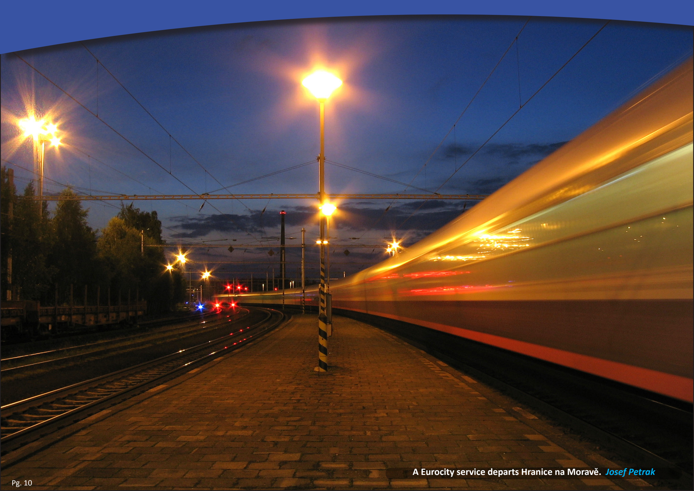
A Eurocity service departs Hranice na Moravě.