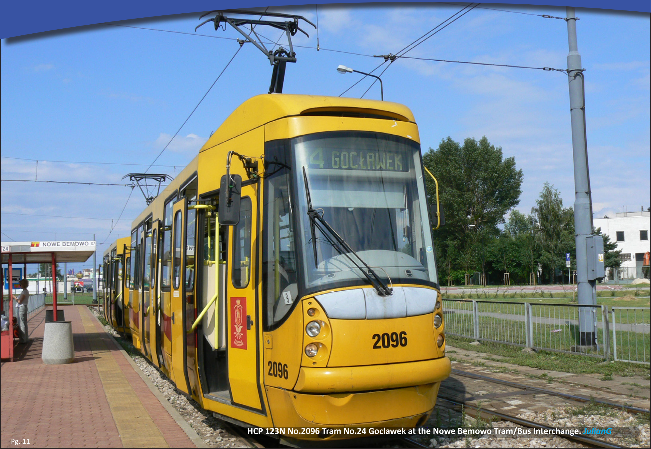
HCP 123N No.2096 Tram No.24 Goclavek at the Nowe Bemowo Tram/Bus Interchange. JulianG