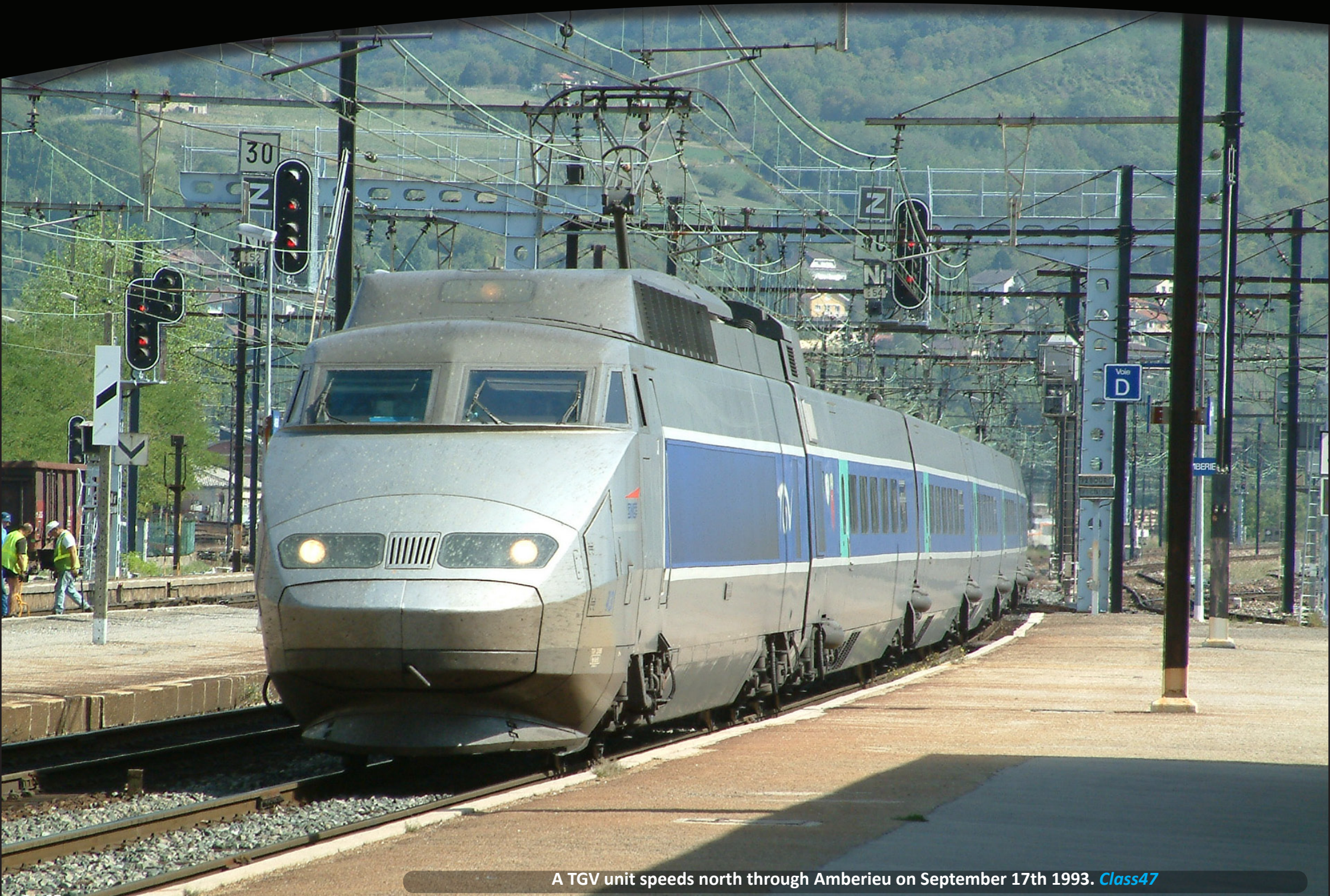
A TGV unit speeds north through Amberieu on September 17th 1993. Class47