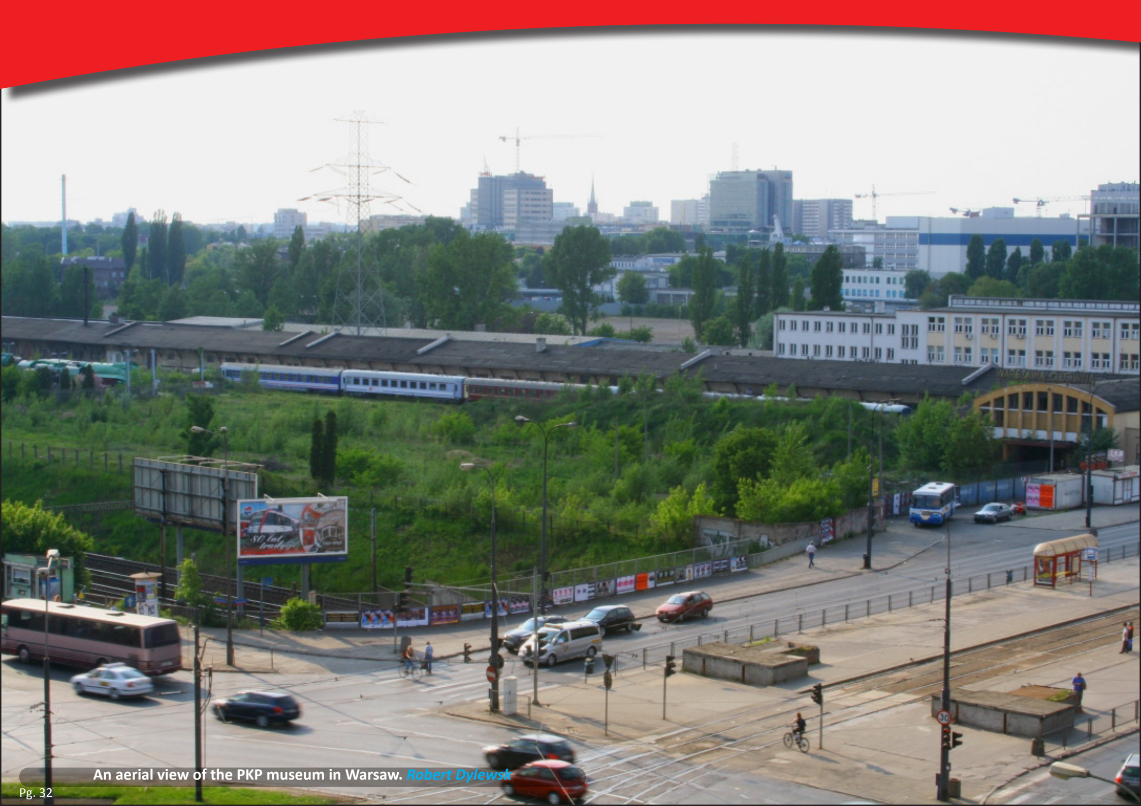
An aerial view of the PKP museum in Warsaw. Robert Dylewski