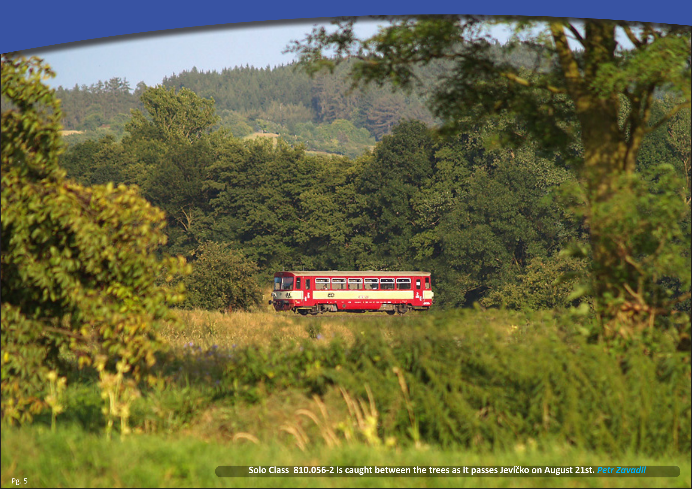
Solo Class 810.056-2 is caught between the trees as it passes Jevíčko on August 21st.