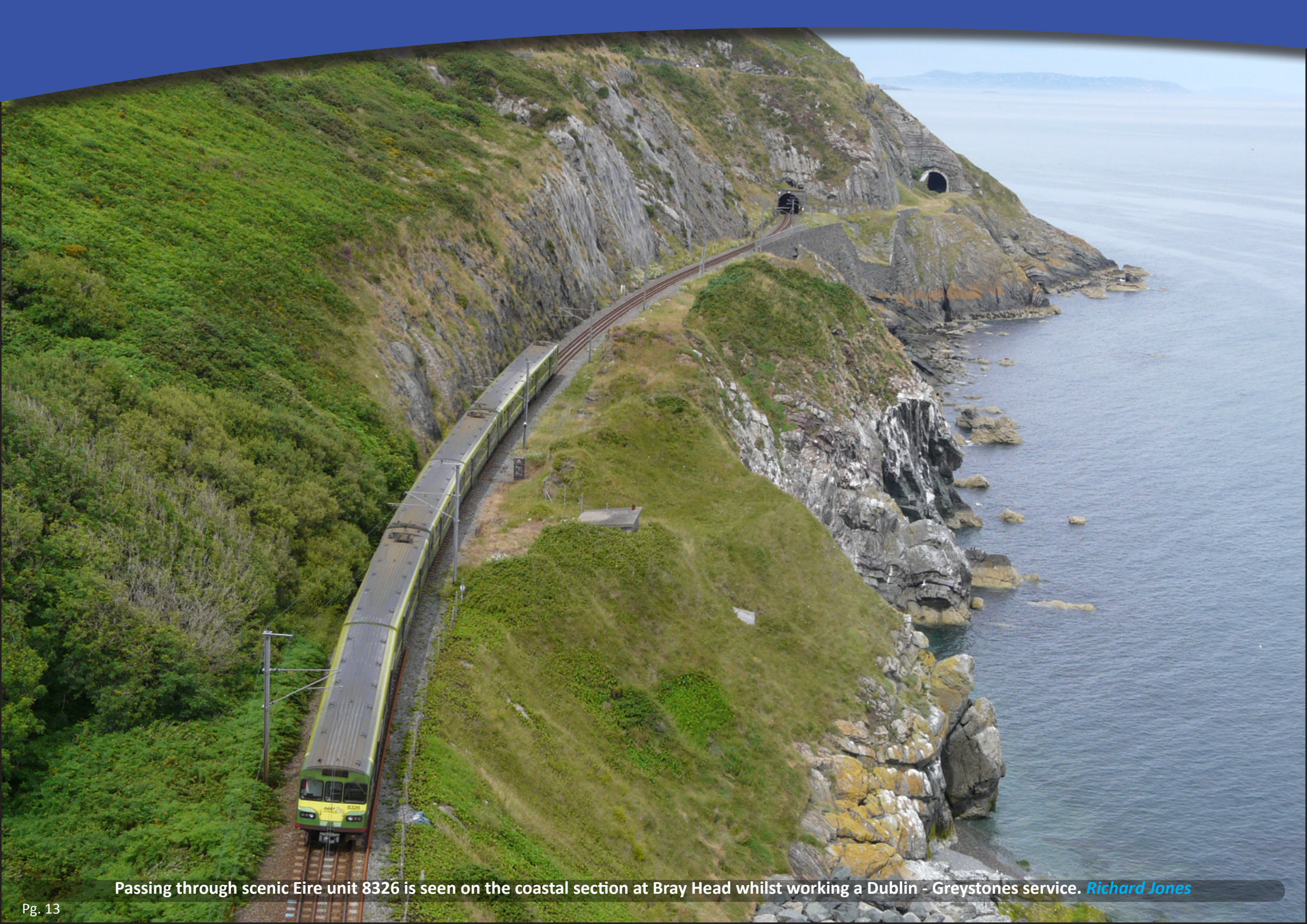
Passing through scenic Eire unit 8326 is seen on the coastal section at Bray Head whilst working a Dublin - Greystones service.