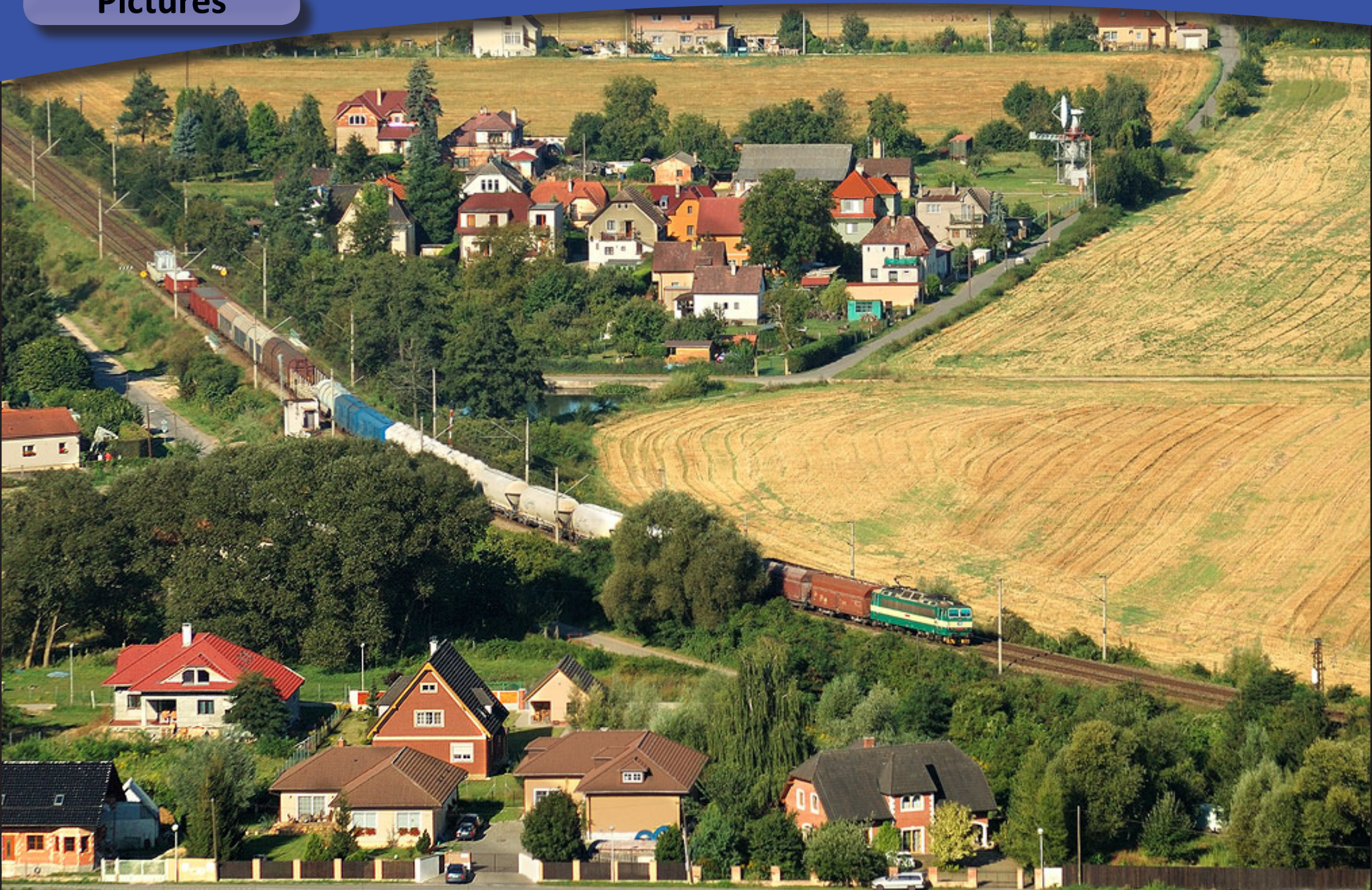
In the summer sunshine, CD Electric 163.006-0 works between Hr. Horní Mokropsy - Černošice - Mokropsy on August 25th.