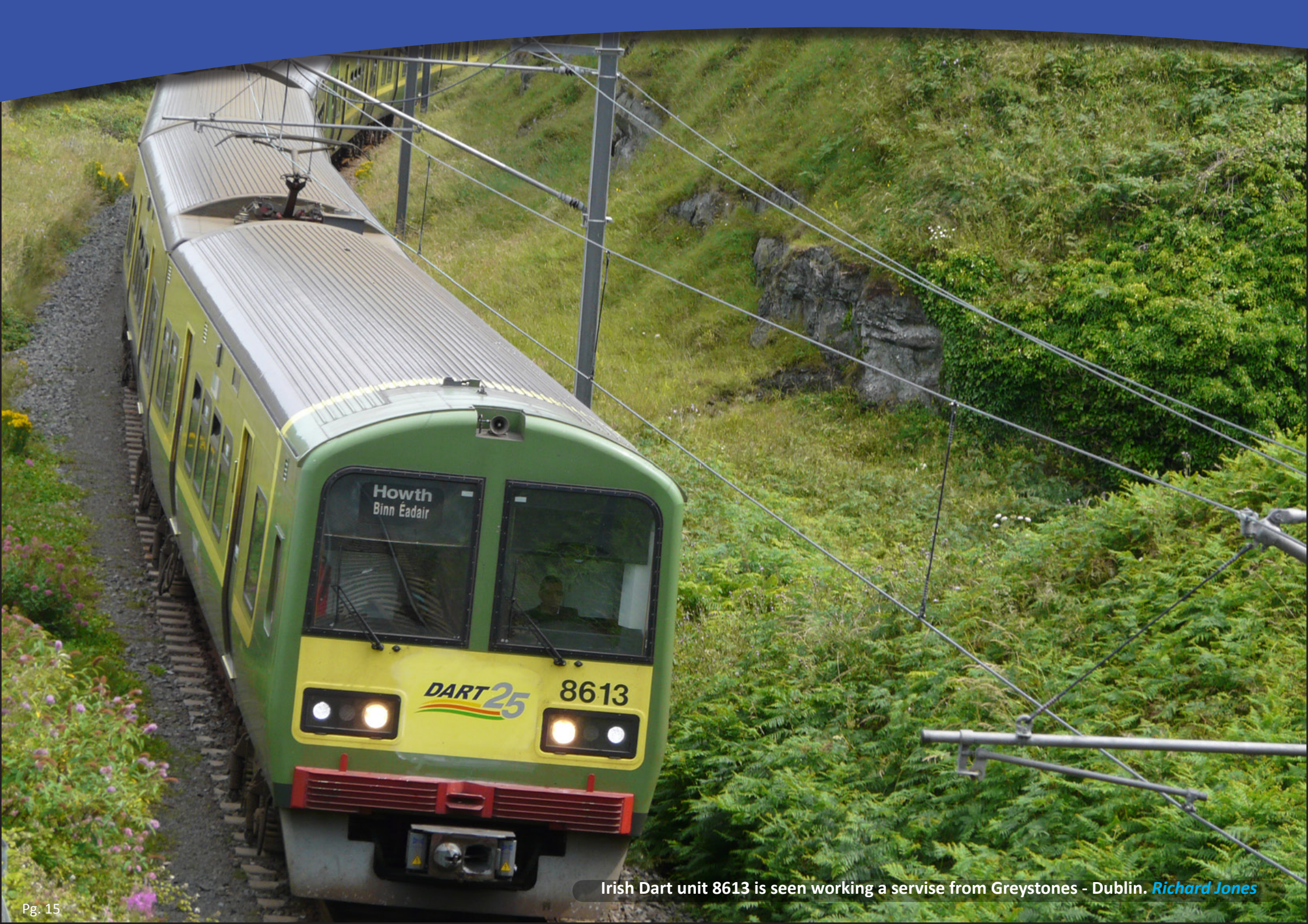
Irish Dart unit 8613 is seen working a service from Greystones - Dublin.