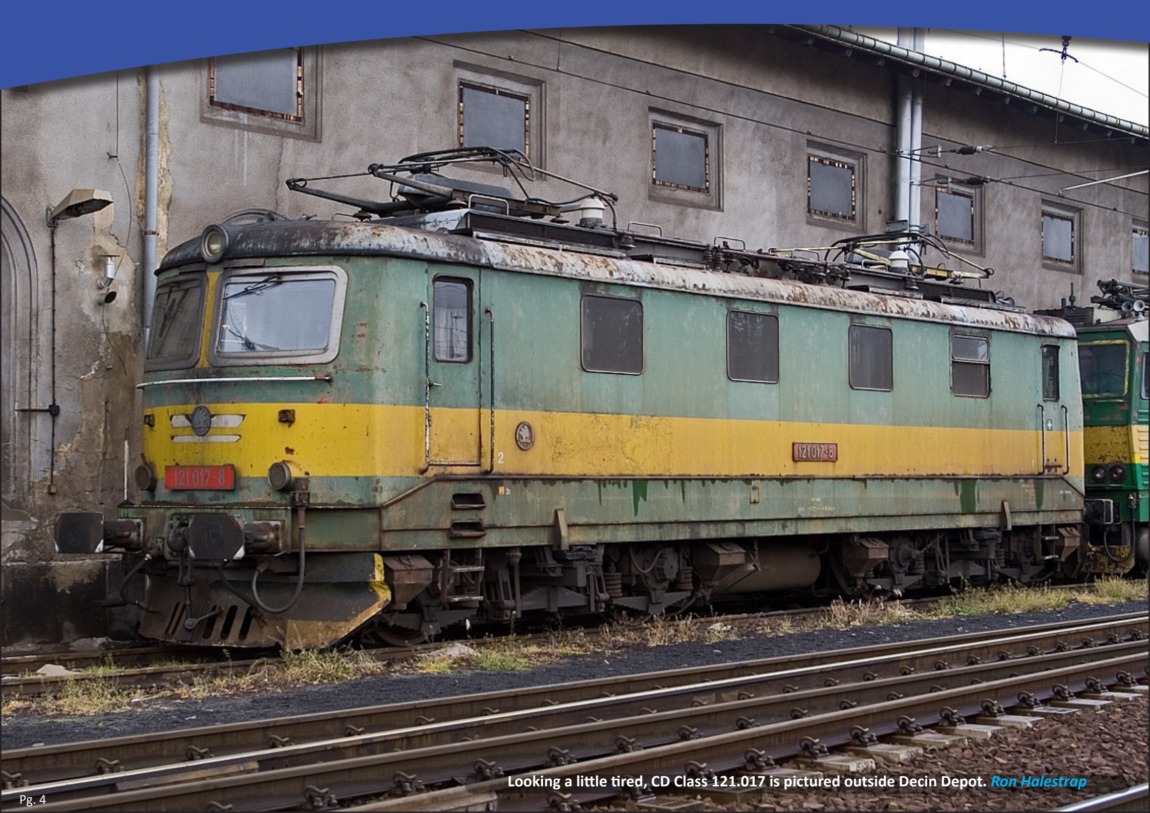
Looking a little tired, CD Class 121.017 is pictured outside Decin Depot. Ron Halestrap