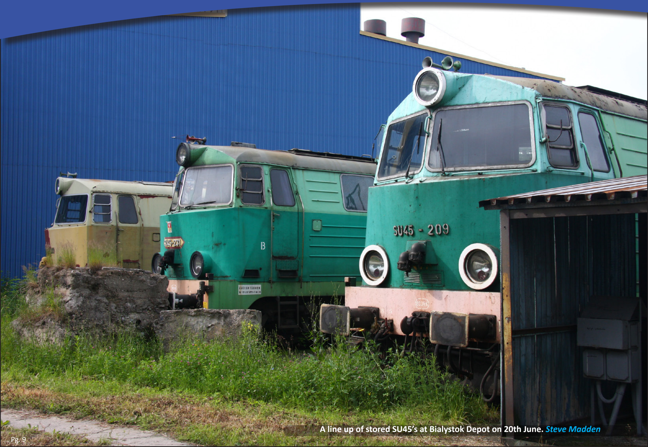
A line up of stored SU45's at Bialystok Depot on 20th June.