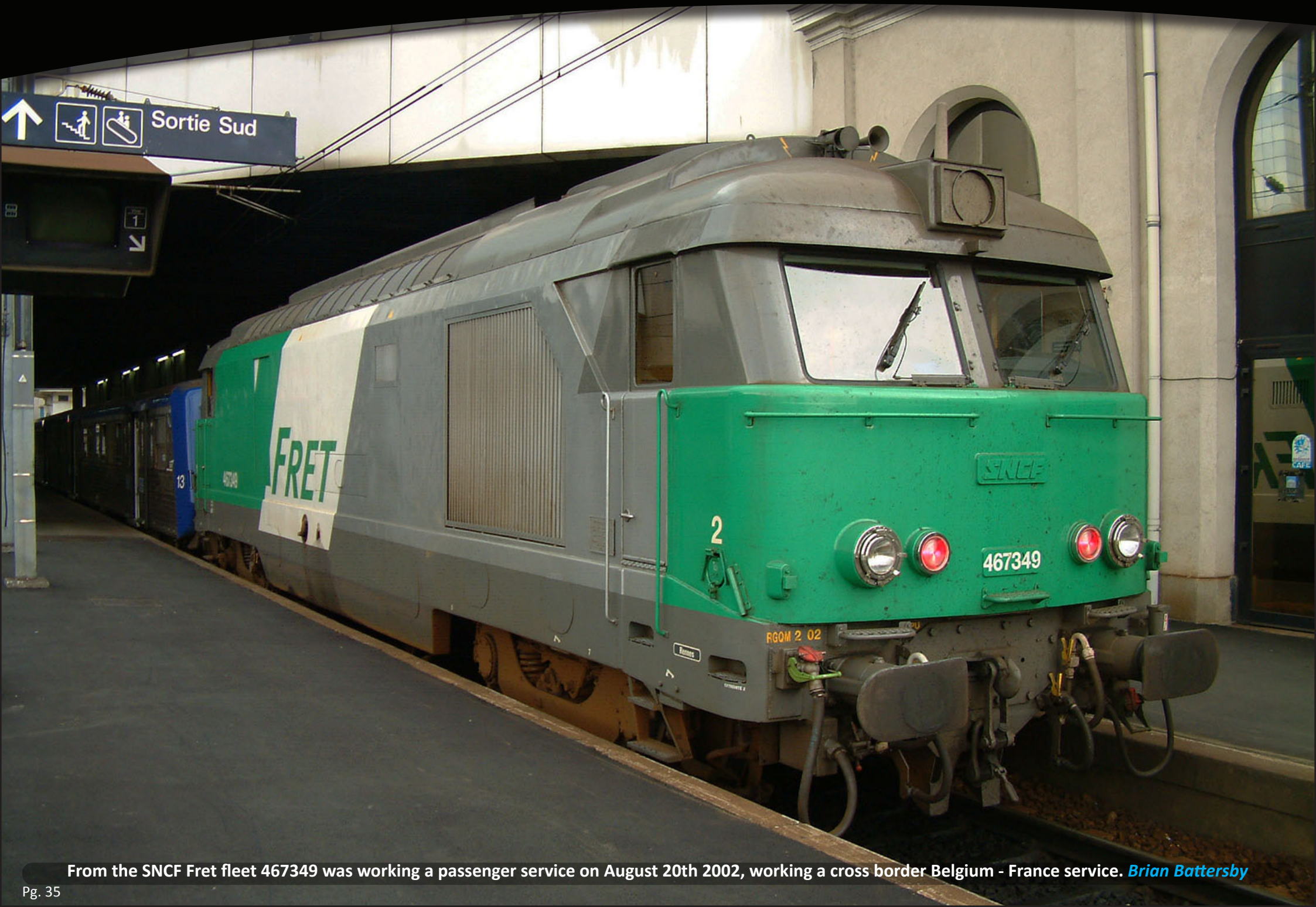
From the SNCF Fret fleet 467349 was working a passenger service on August 20th 2002, working a cross border Belgium - France service. Brian Battersby