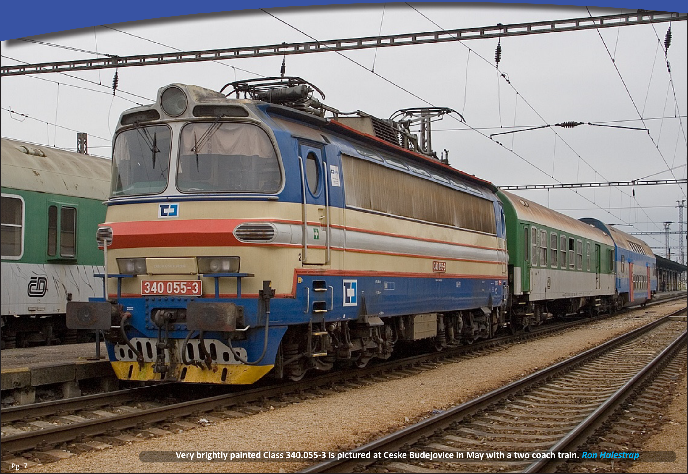
Very brightly painted Class 340.055-3 is pictured at Ceske Budejovice in May with a two coach train.