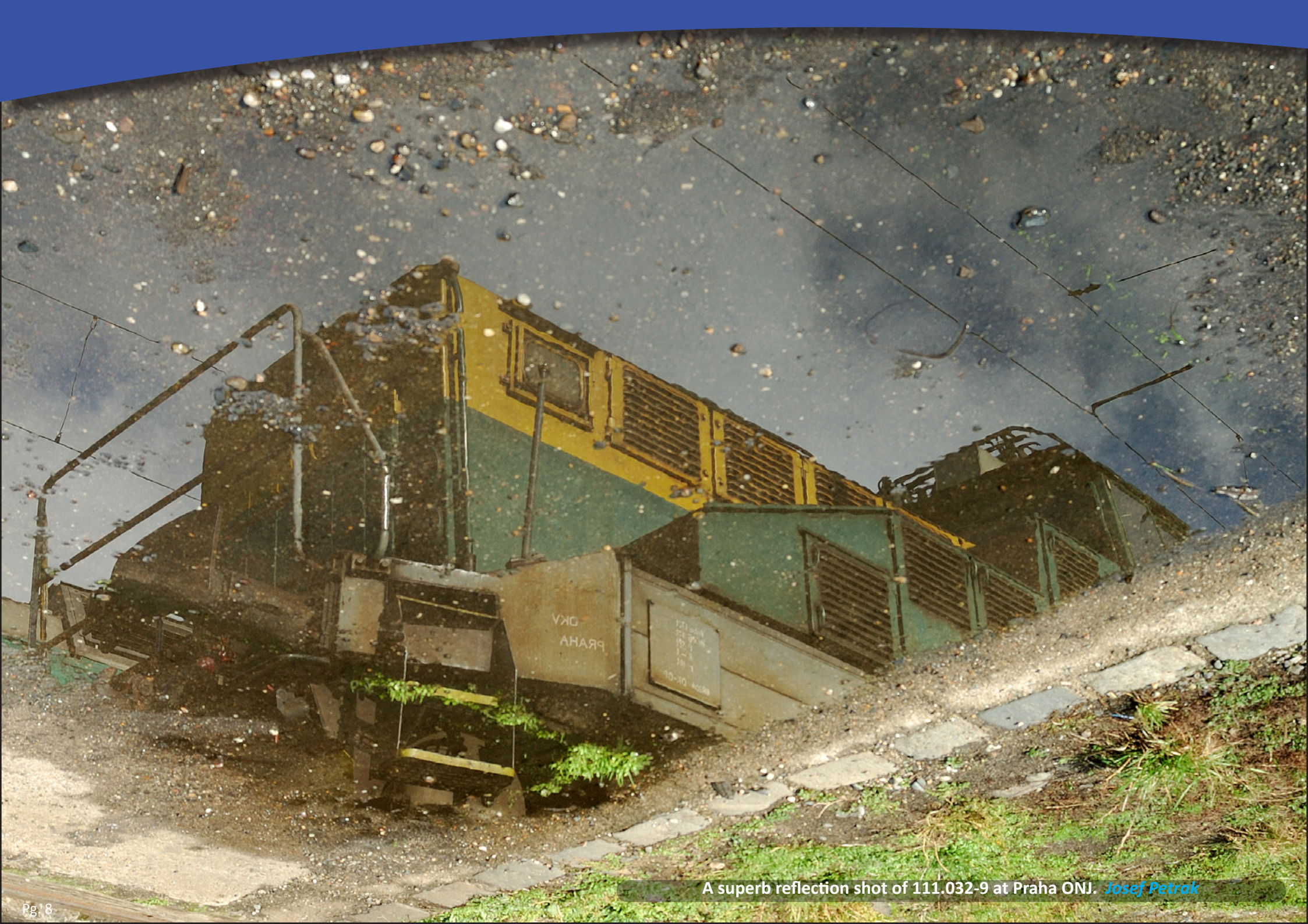
A superb reflection shot of 111.032-9 at Praha ONJ.