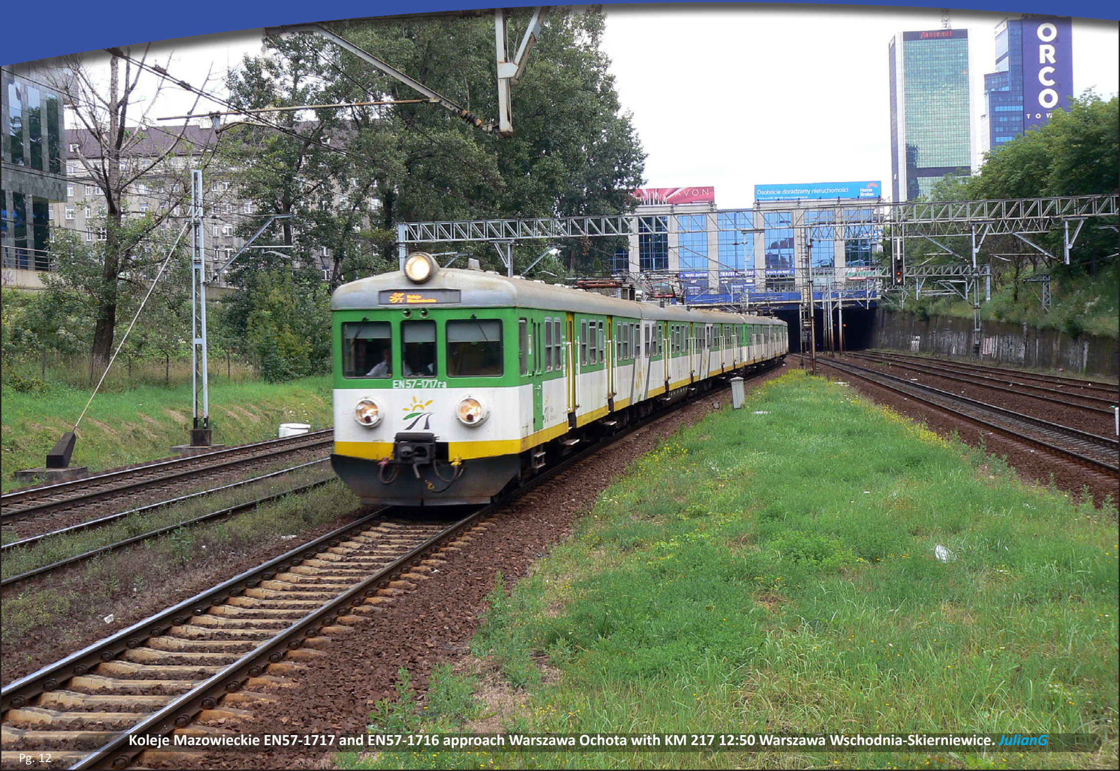
Koleje Mazowieckie EN57-1717 and EN57-1716 approach Warszawa Ochota with KM 217 12:50 Warszawa Wschodnia-Skierniewice. JulianG