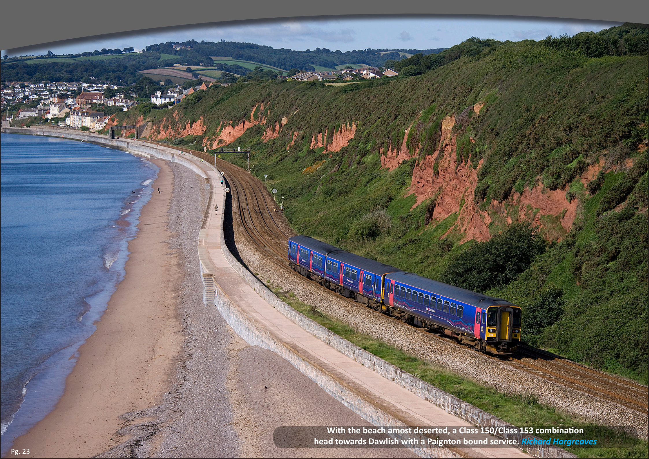
With the beach almost deserted, a Class 150/Class 153 combination head towards Dawlish with a Paignton bound service.