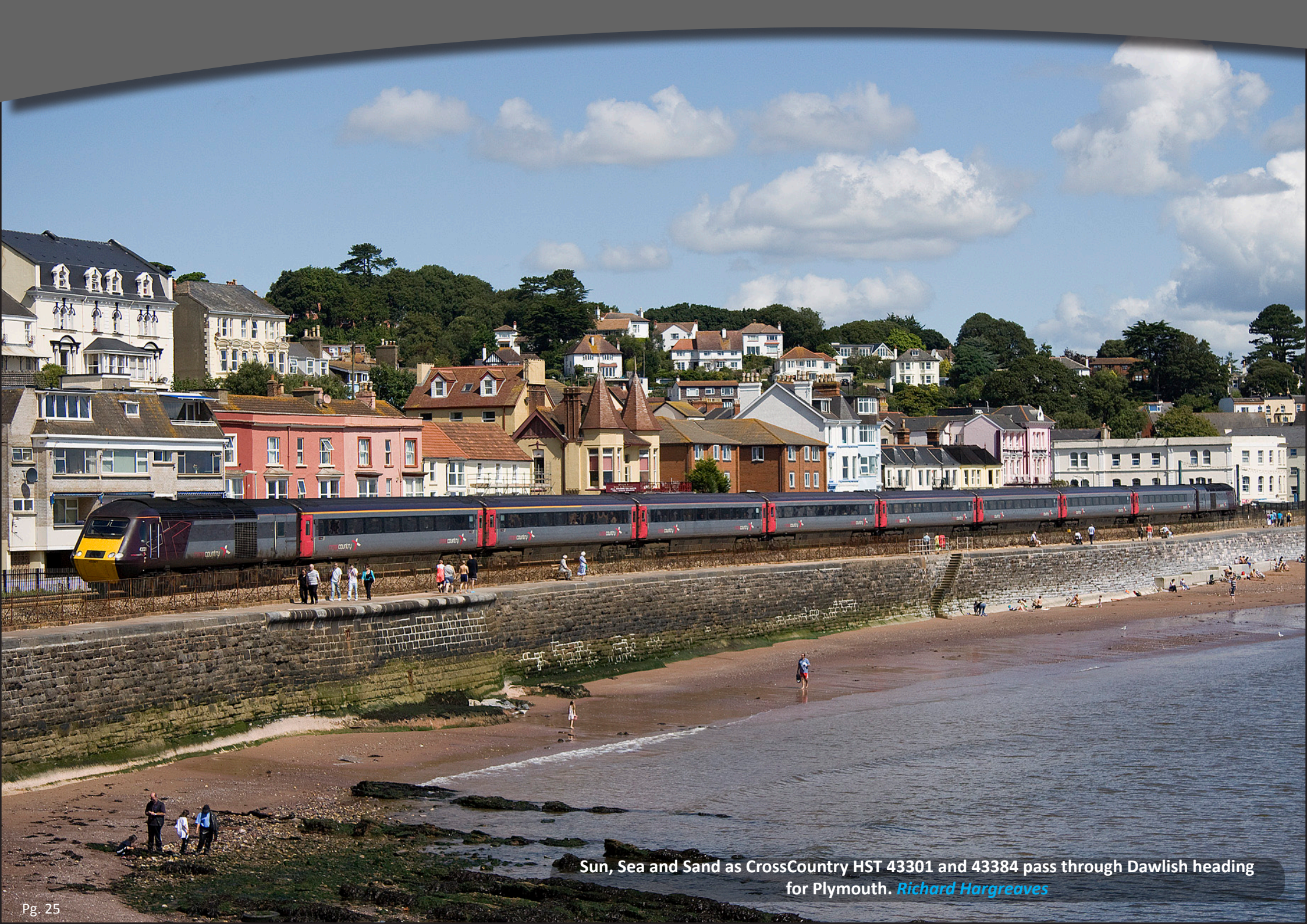
Sun, Sea and Sand as CrossCountry HST 43301 and 43384 pass through Dawlish heading for Plymouth.