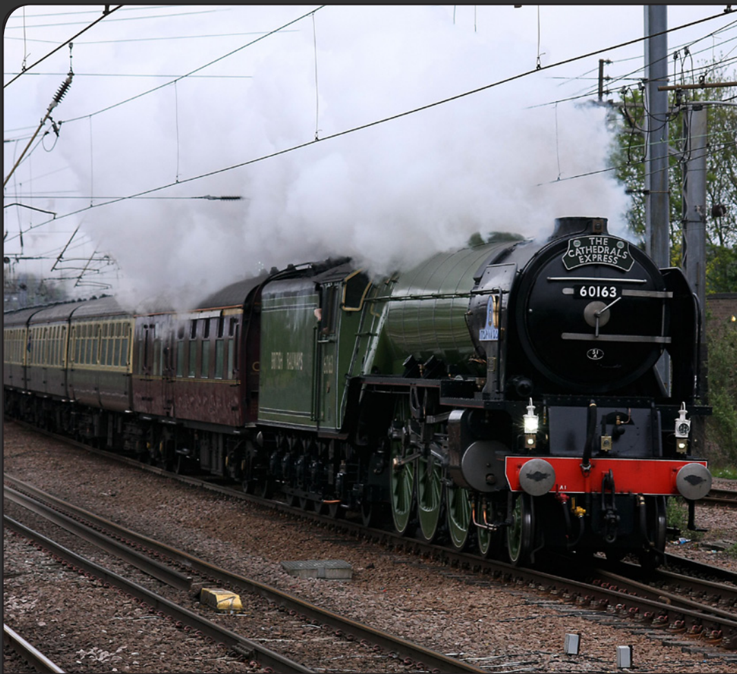
Above: A1 No. 60163 "Tornado" powers north through Alexandra Palace with 1222 Kings Cross to York "The Cathedrals Express" on May 8th.