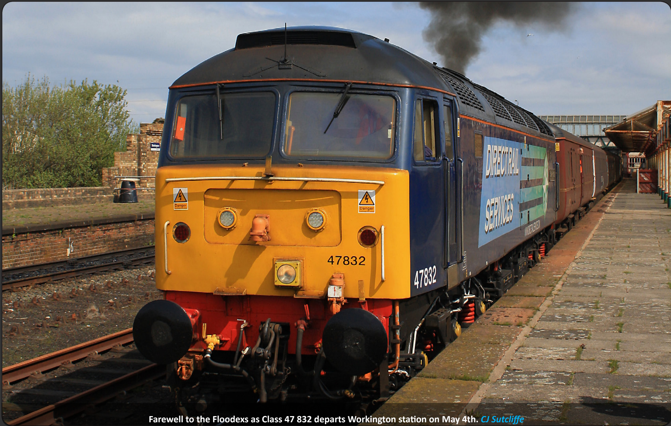
Farewell to the Floodexs as Class 47 832 departs Workington station on May 4th. CJ Sutcliffe