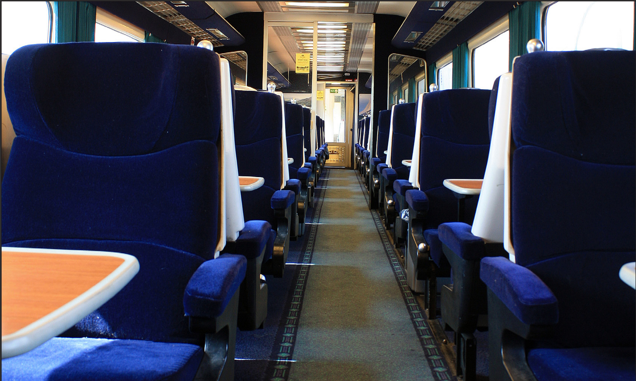
After the comments recently regarding Wrexham and Shropshire's quality stock, we are reminded that DRS have been running some pretty luxurious coaches on the Floodex. This is a shot of the inside of an ex-Intercity First Class coach, which was was refurbished by DRS for charter use.