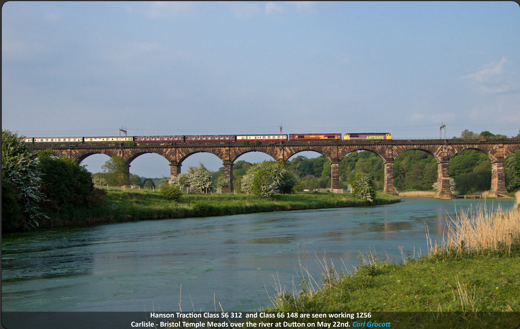
Hanson Traction Class 56 312 and Class 66 148 are seen working 1256 Carlisle - Bristol Temple Meads over the river at Dutton on May 22nd.