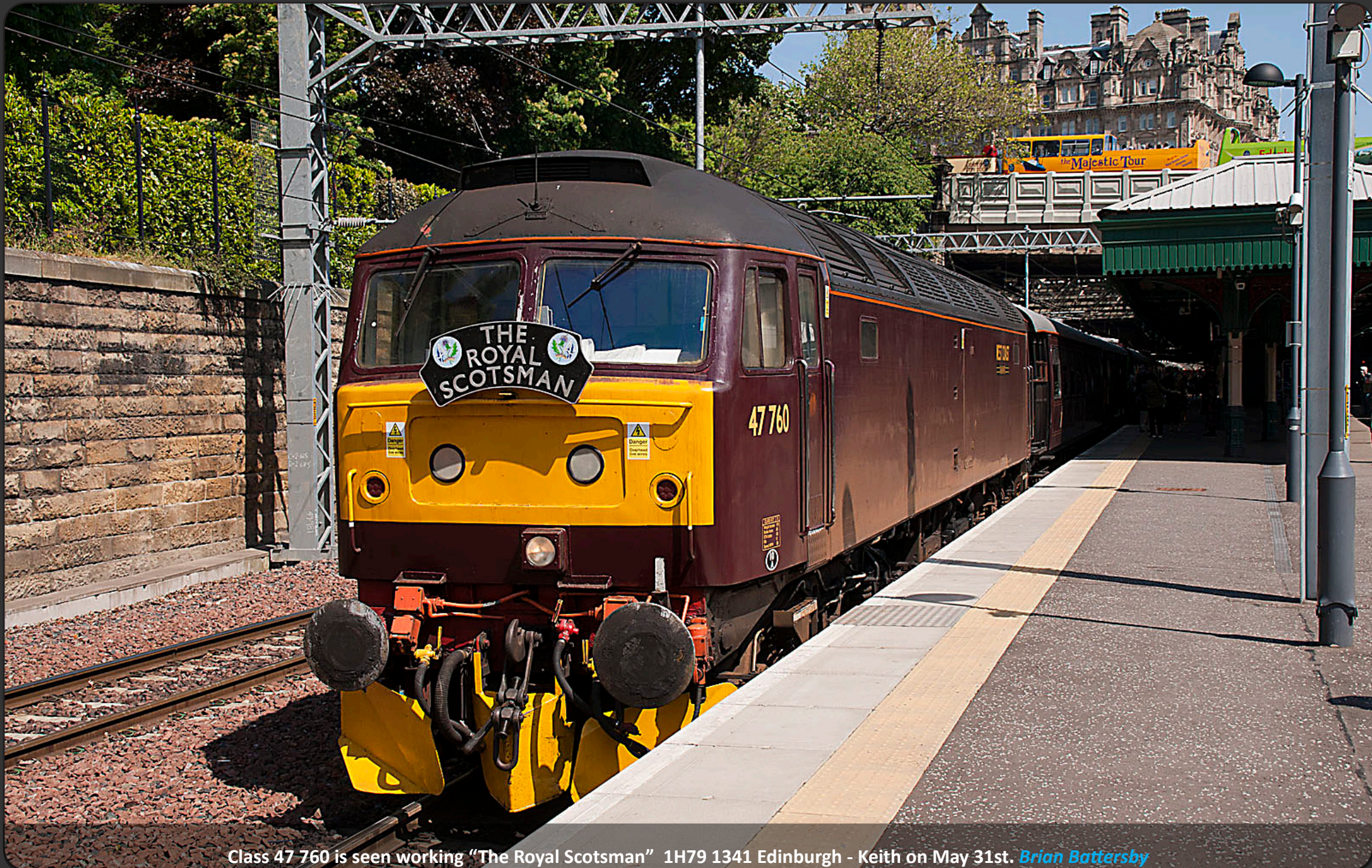
Class 47 760 is seen working "The Royal Scotsman" 1H79 1341 Edinburgh - Keith on May 31st.