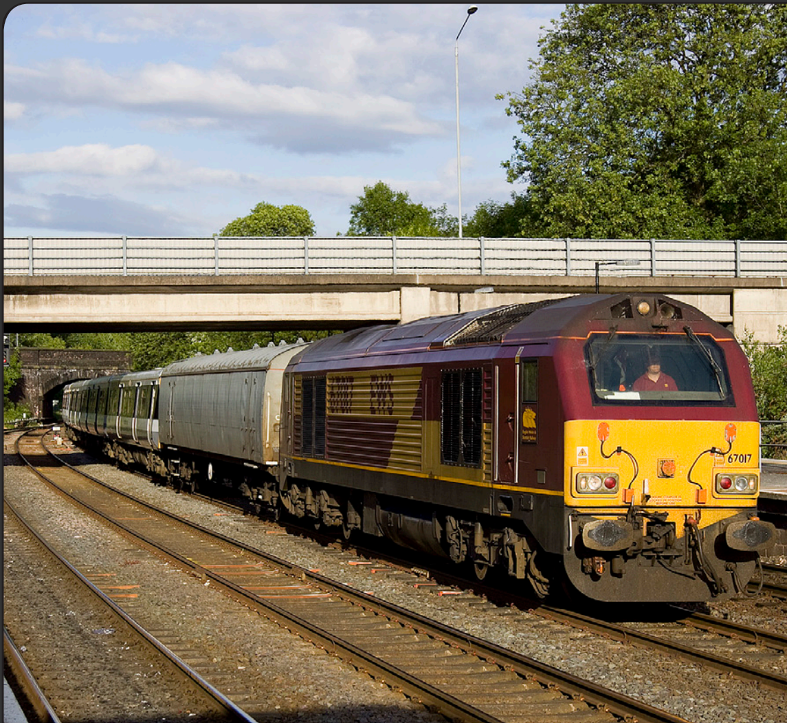
Above: Class 67 017 works 5272 Stewarts Lane - Telford IRFP Class 508 move through Wellington on May 28th.