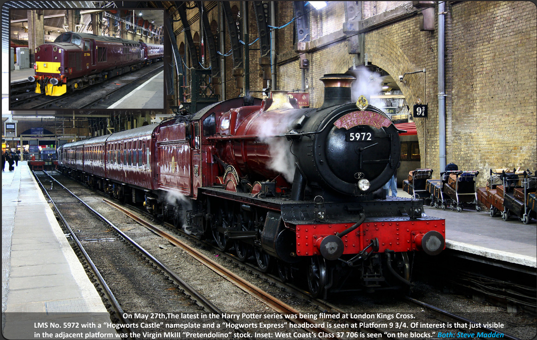
On May 27th, The latest in the Harry Potter series was being filmed at London Kings Cross. LMS No. 5972 with a "Hogwarts Castle" nameplate and a "Hogwarts Express" headboard is seen at Platform 9 3/4. Of interest is that just visible in the adjacent platform was the Virgin MkIII "Pretendolino" stock. Inset: West Coast's Class 37 706 is seen "on the blocks."