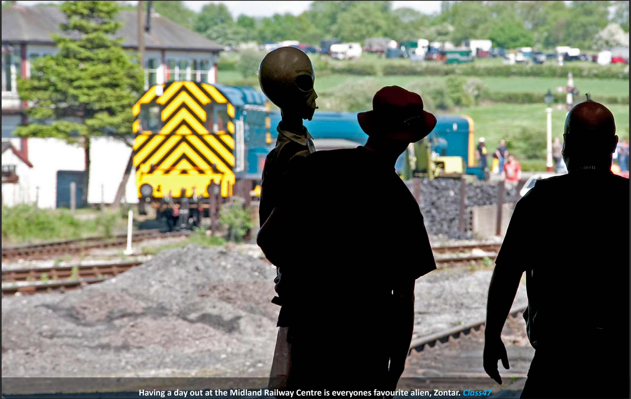
Having a day out at the Midland Railway Centre is everyones favourite alien, Zontar. Class47