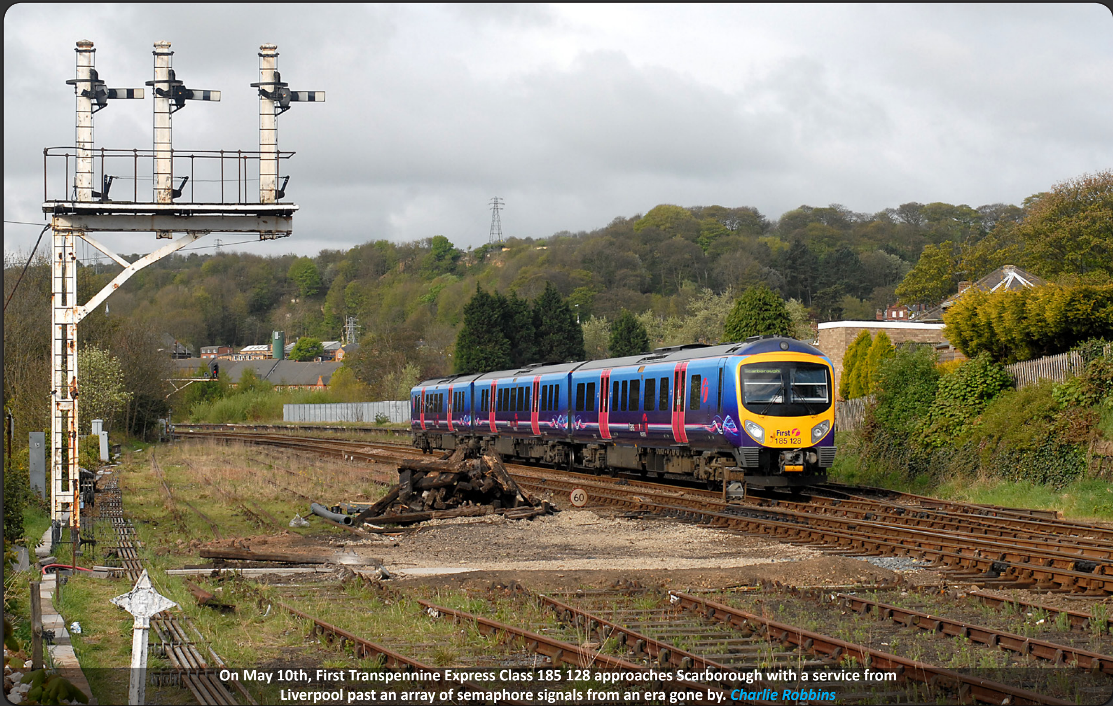
On May 10th, First Transpennine Express Class 185 128 approaches Scarborough with a service from Liverpool past an array of semaphore signals from an era gone by.