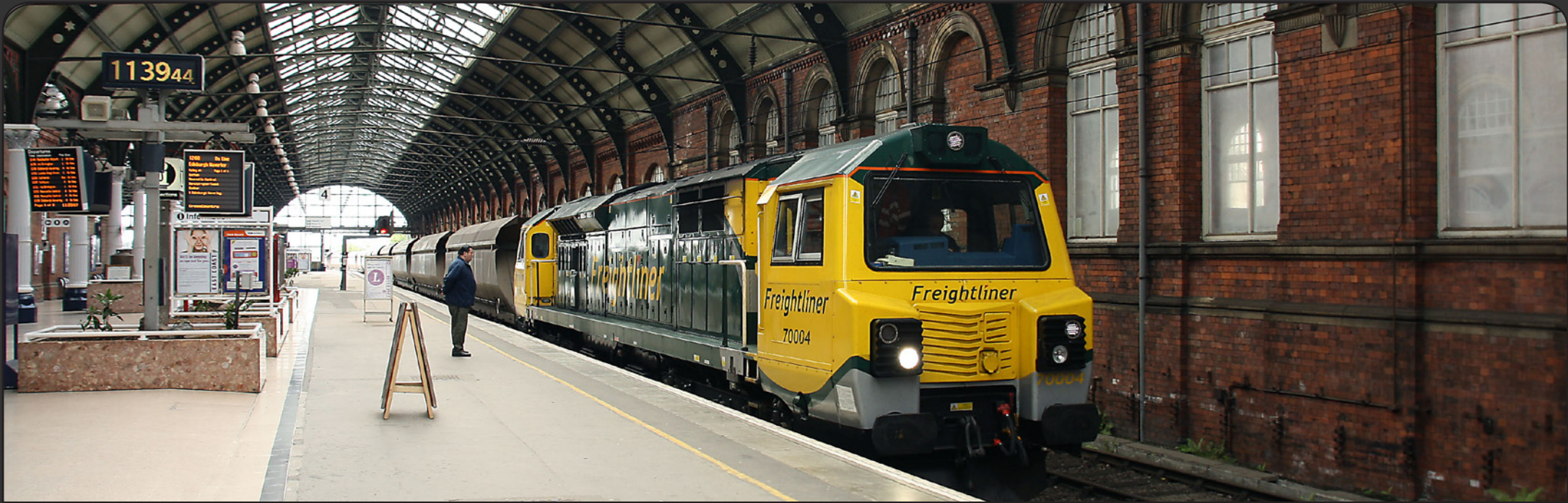
Above: On May 13th, Class 70 004 is seen at Darlington working 4S60 Holgate to Ravenstruther coal train.