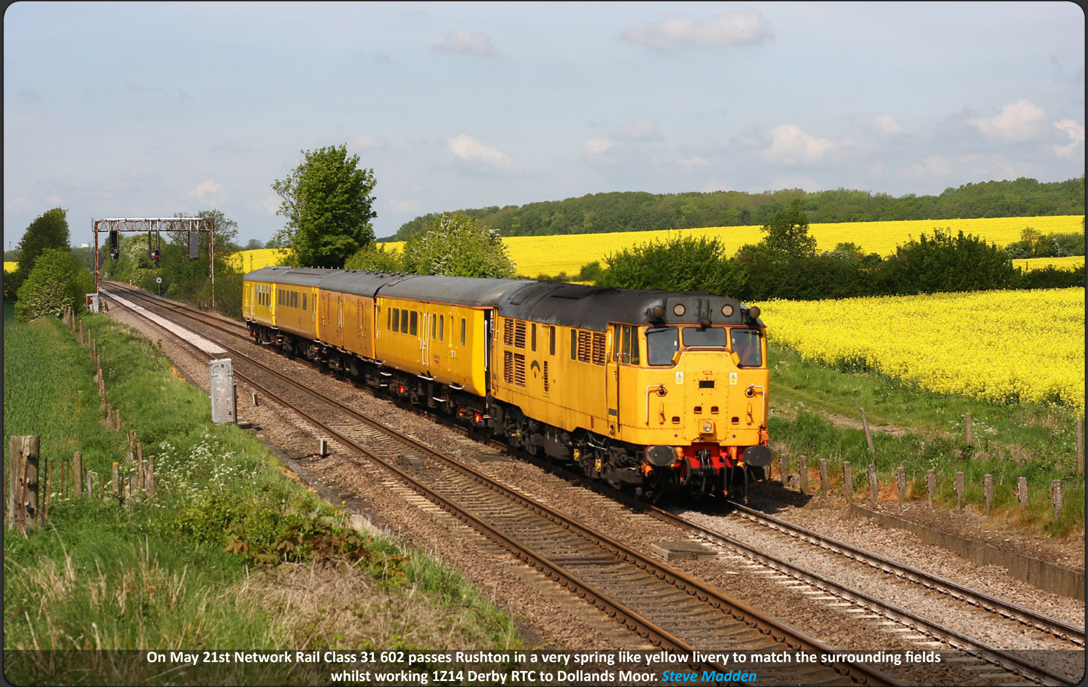
On May 21st Network Rail Class 31 602 passes Rushton in a very spring like yellow livery to match the surrounding fields whilst working 1Z14 Derby RTC to Dollands Moor.