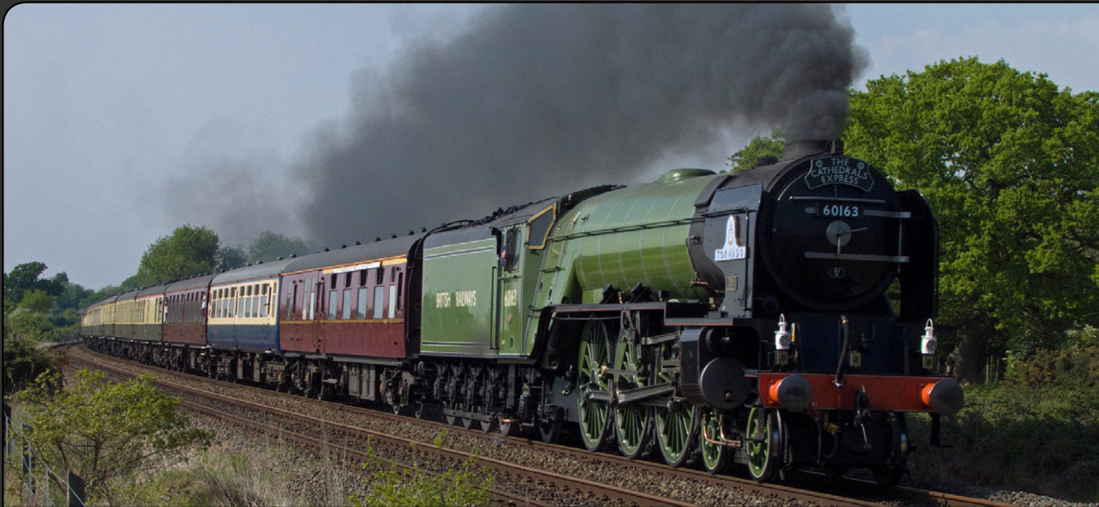
Top Left: Peppercorn A1 No. 60163 "Tornado" is seen passing Rowton working the return Cathedrals Express 1Z63 Chester - Euston on May 22nd. Carl Grocott