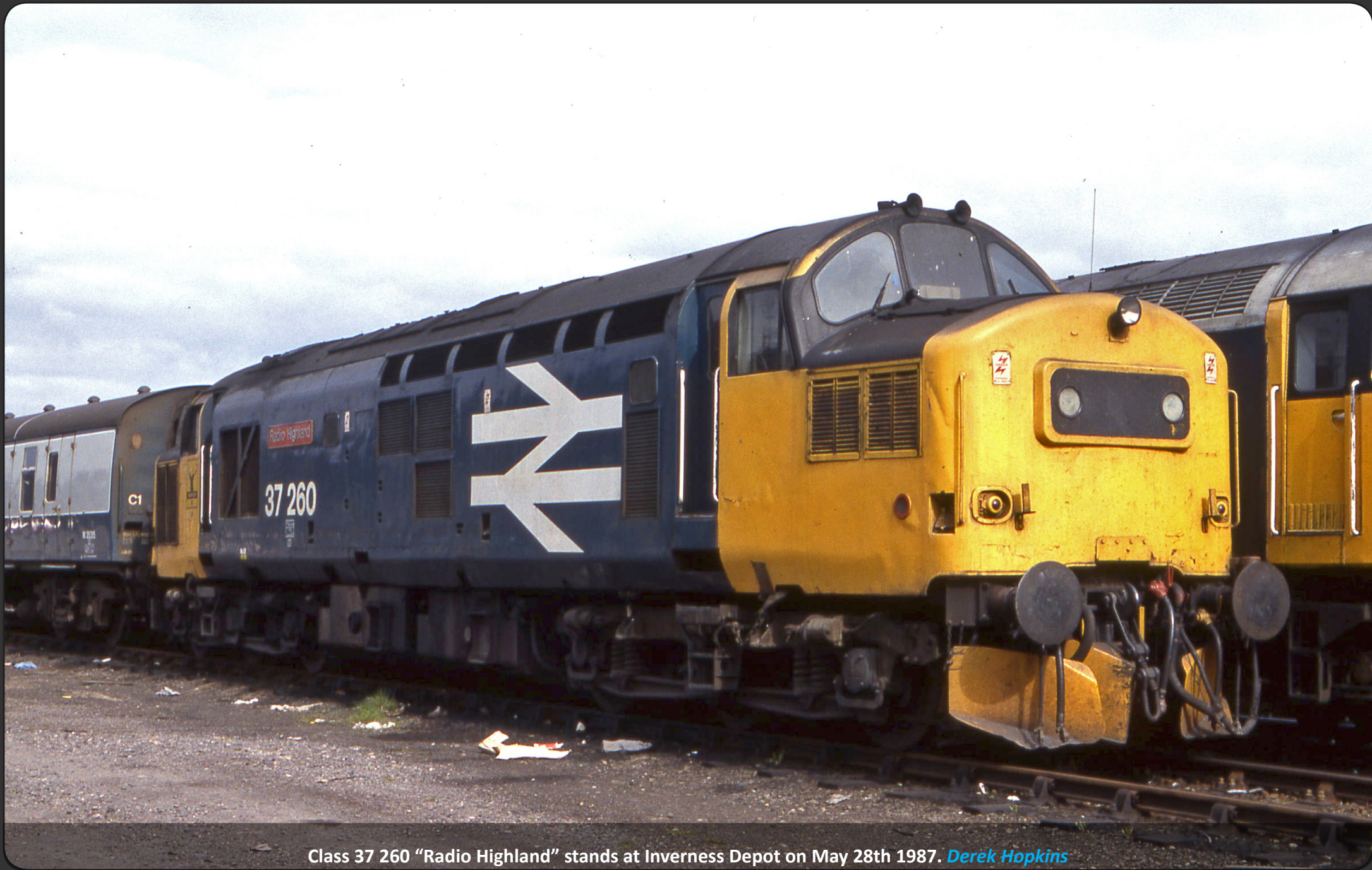
Class 37 260 "Radio Highland" stands at Inverness Depot on May 28th 1987. Derek Hopkins