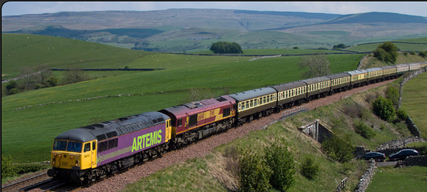
Left: Pathfinder's tour featuring Class 56 312 and Class 66 148 are seen heading for Carlisle, through Waitby. Carl Grocott