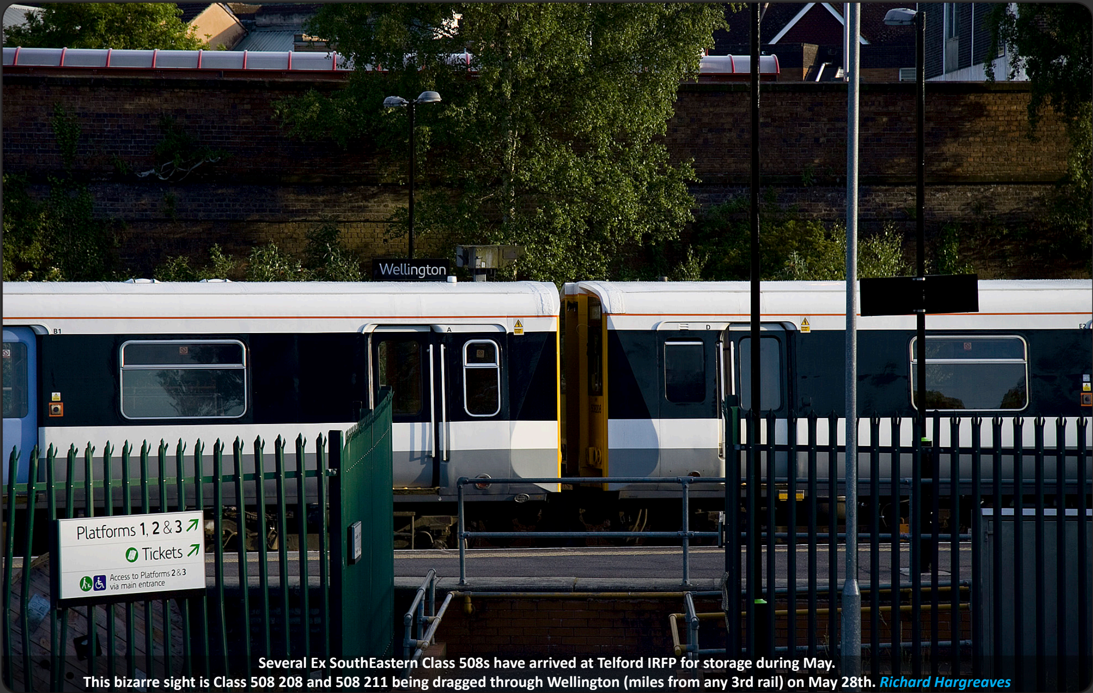
Several Ex SouthEastern Class 508s have arrived at Telford IRFP for storage during May. This bizarre sight is Class 508 208 and 508 211 being dragged through Wellington (miles from any 3rd rail) on May 28th.