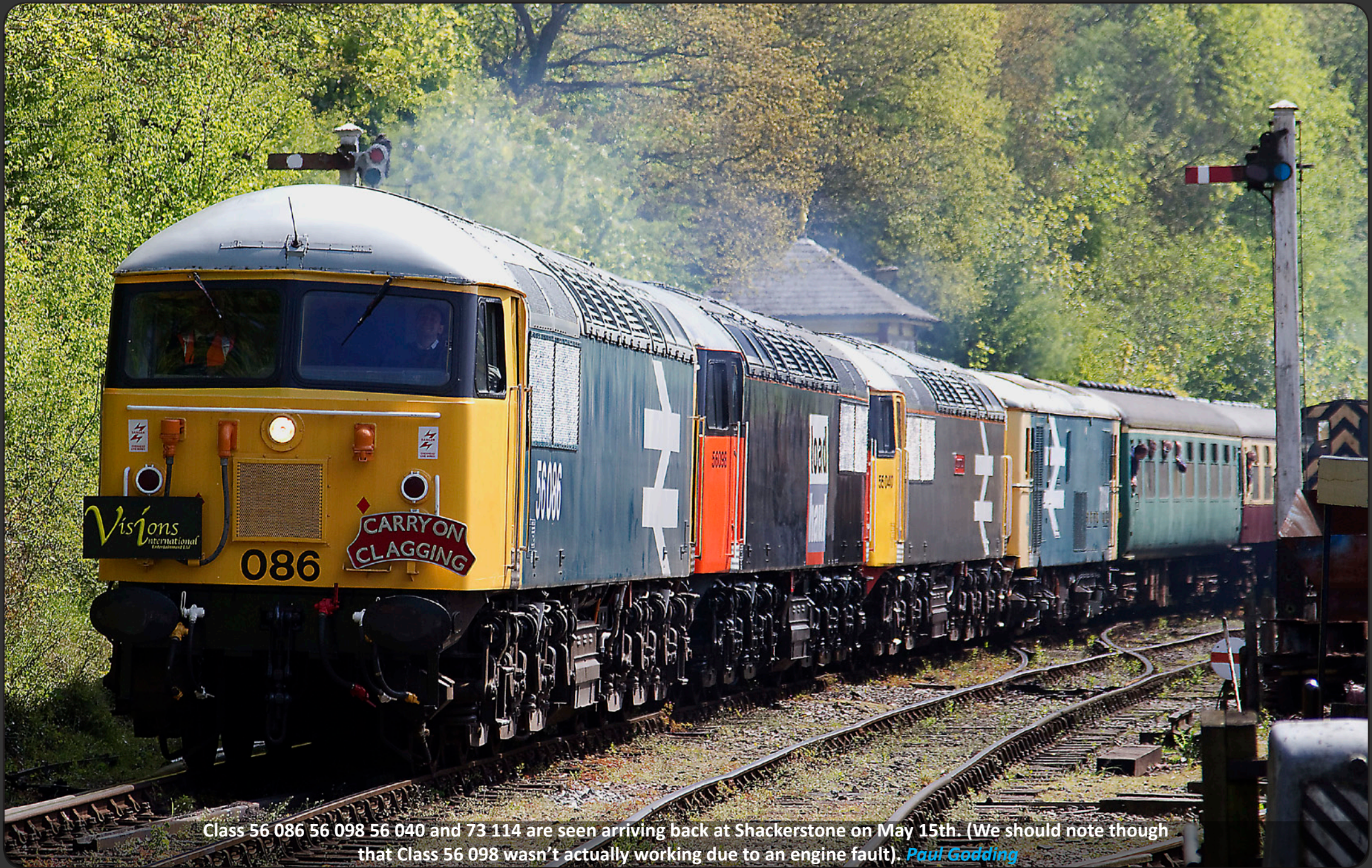
Class 56 086 56 098 56 040 and 73 114 are seen arriving back at Shackerstone on May 15th. (We should note though that Class 56 098 wasn't actually working due to an engine fault).