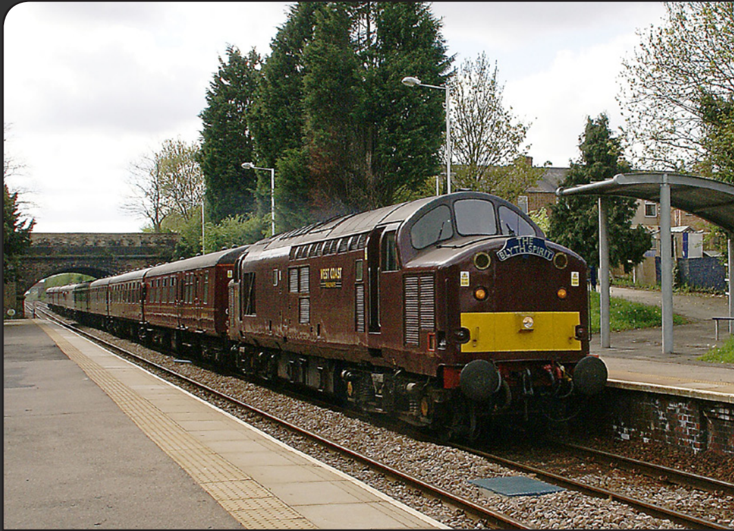
Above: Deputising for a failed K1 steam loco, on May 8th West Coast Class 37 516 is seen passing through Dinsdale, with "The Blyth Spirit" raittour from Carnforth to Morpeth.