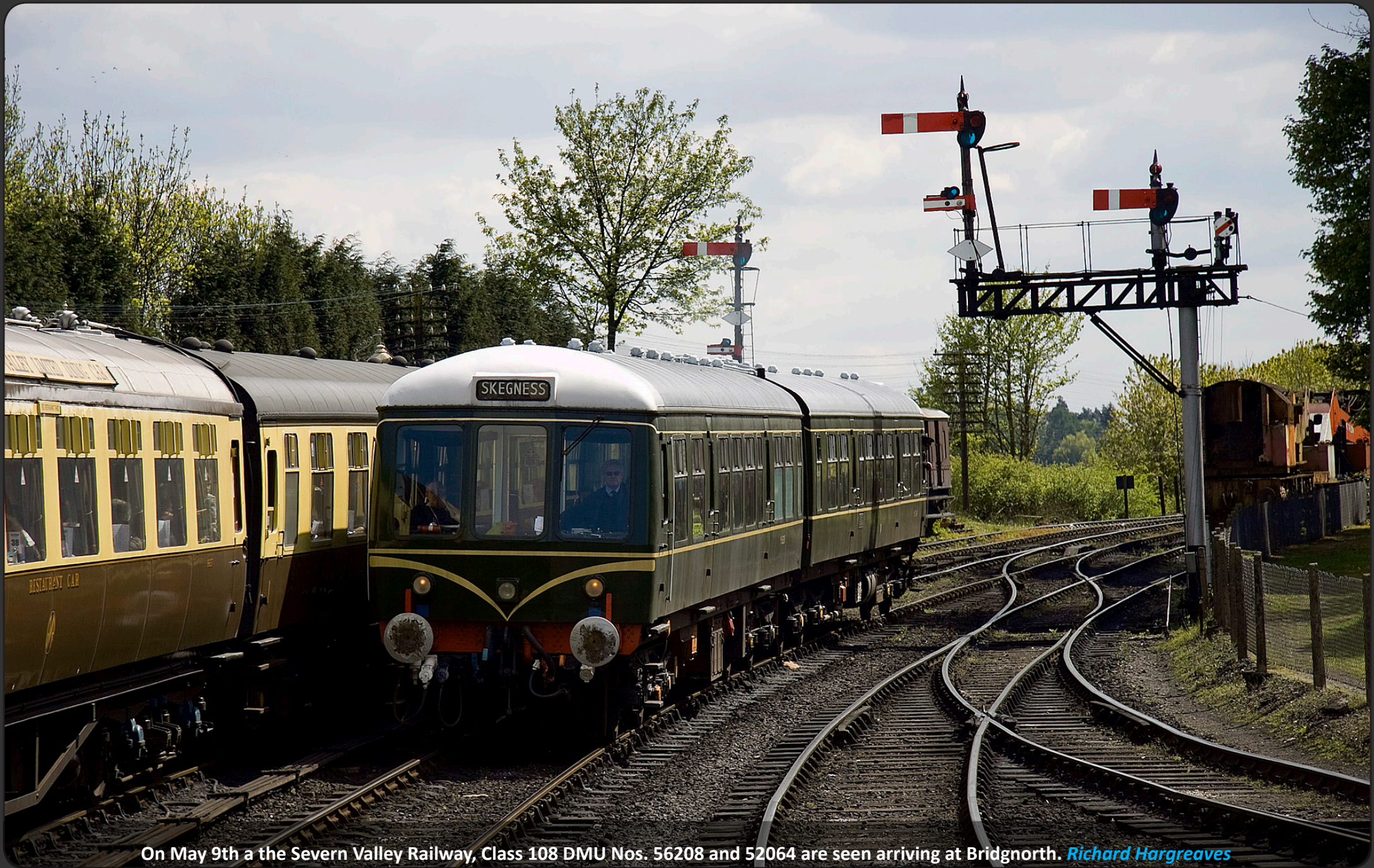
On May 9th at the Severn Valley Railway, Class 108 DMU Nos. 56208 and 52064 are seen arriving at Bridgnorth.