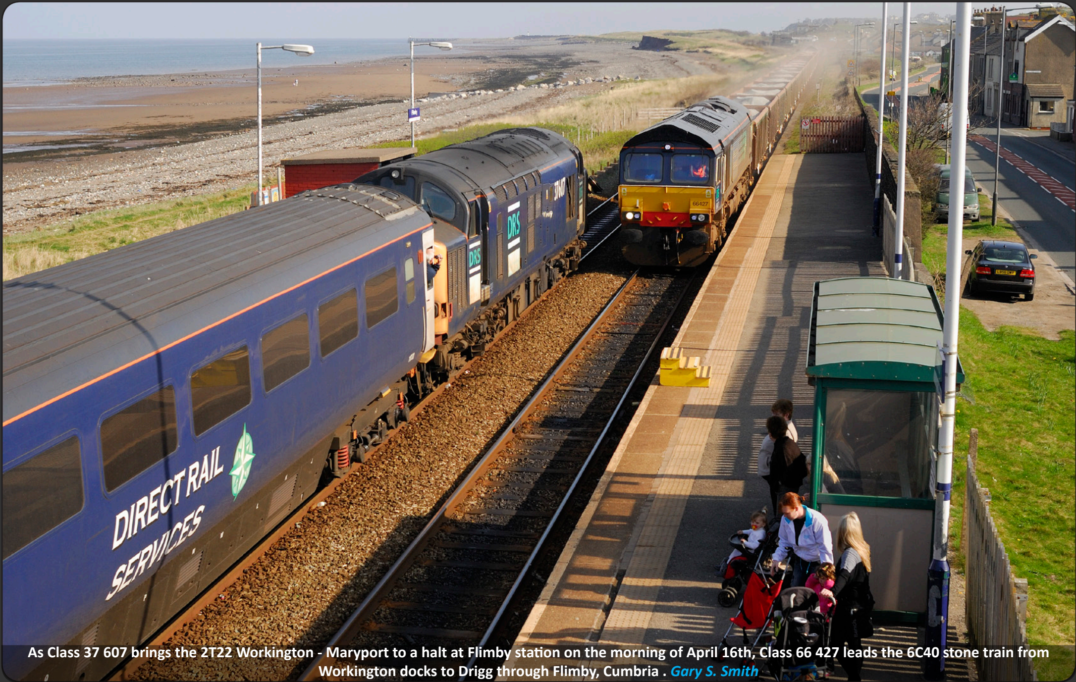
As Class 37 607 brings the 2T22 Workington - Maryport to a halt at Flimby station on the morning of April 16th, Class 66 427 leads the 6C40 stone train from Workington docks to Drigg through Flimby, Cumbria . Gary S. Smith