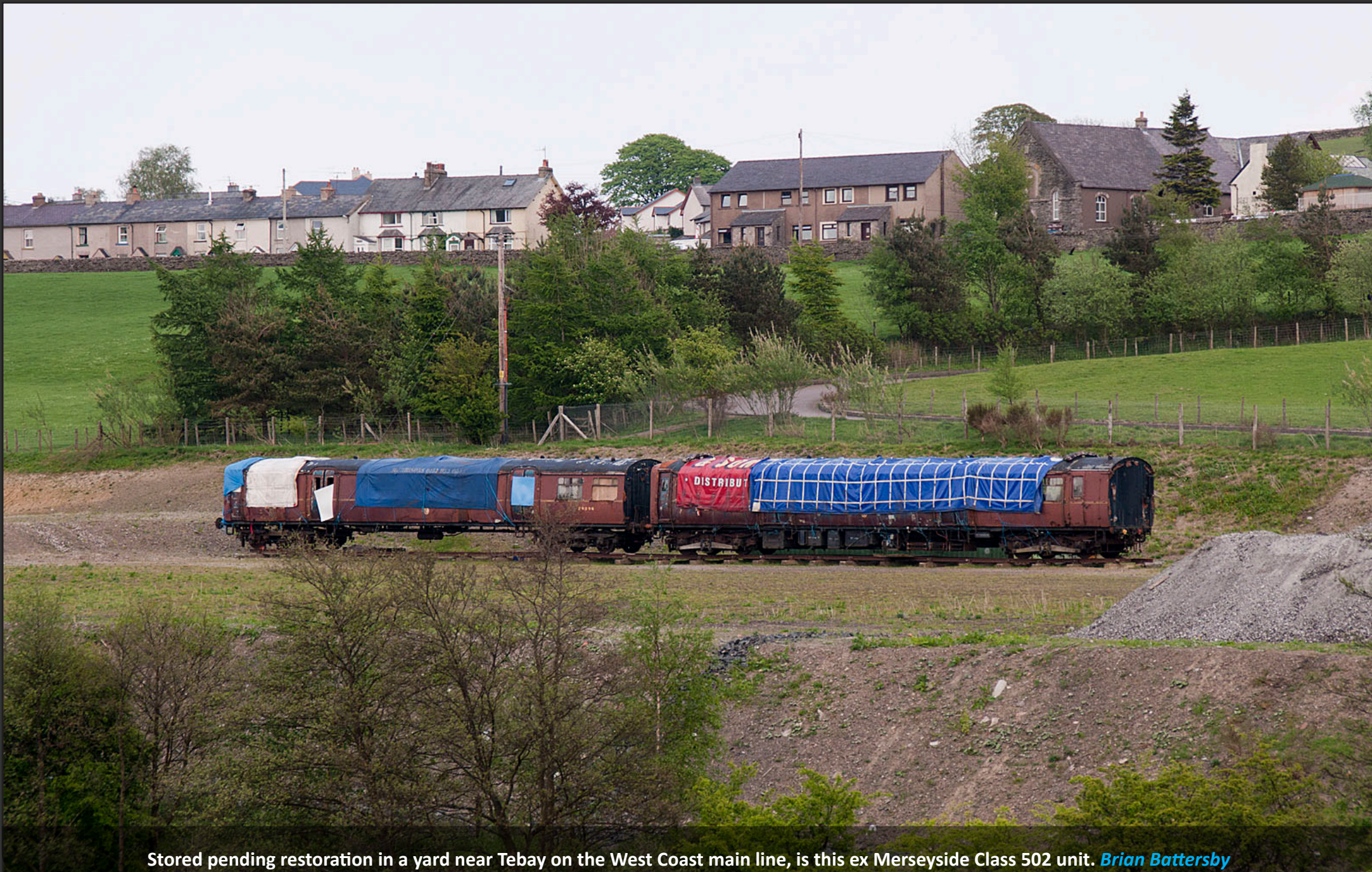
Stored pending restoration in a yard near Tebay on the West Coast main line, is this ex Merseyside Class 502 unit. Brian Battersby