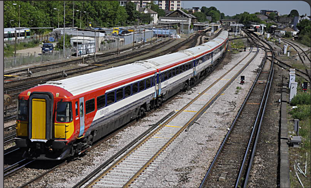
Top Right: Class 442 206 and 442 213 are seen working the Southern Electric Groups "Ruby Rover" raittour, running as 1240 through Norwood Junction on May 23rd.