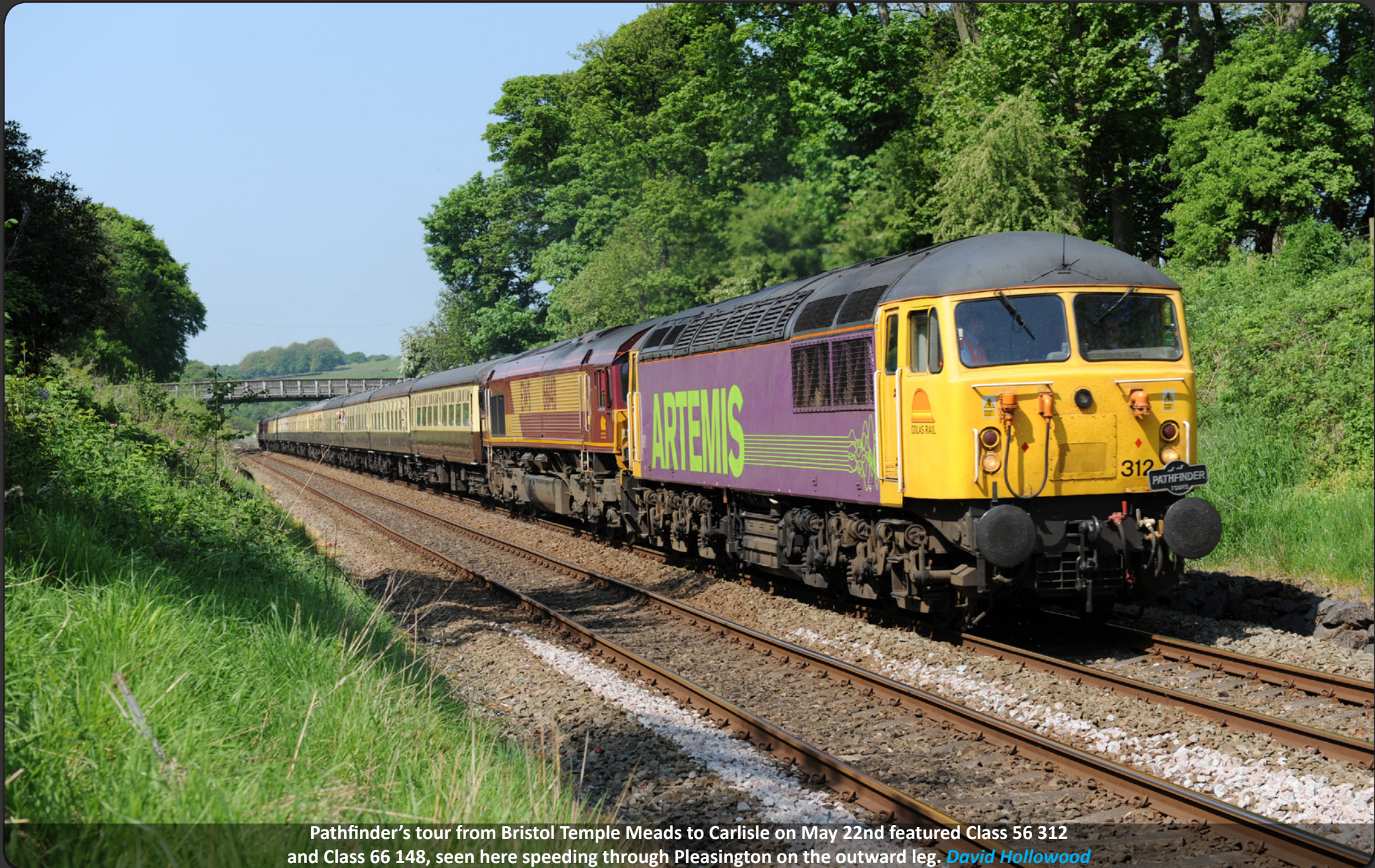
Pathfinder's tour from Bristol Temple Meads to Carlisle on May 22nd featured Class 56 312 and Class 66 148, seen here speeding through Pleasington on the outward leg.