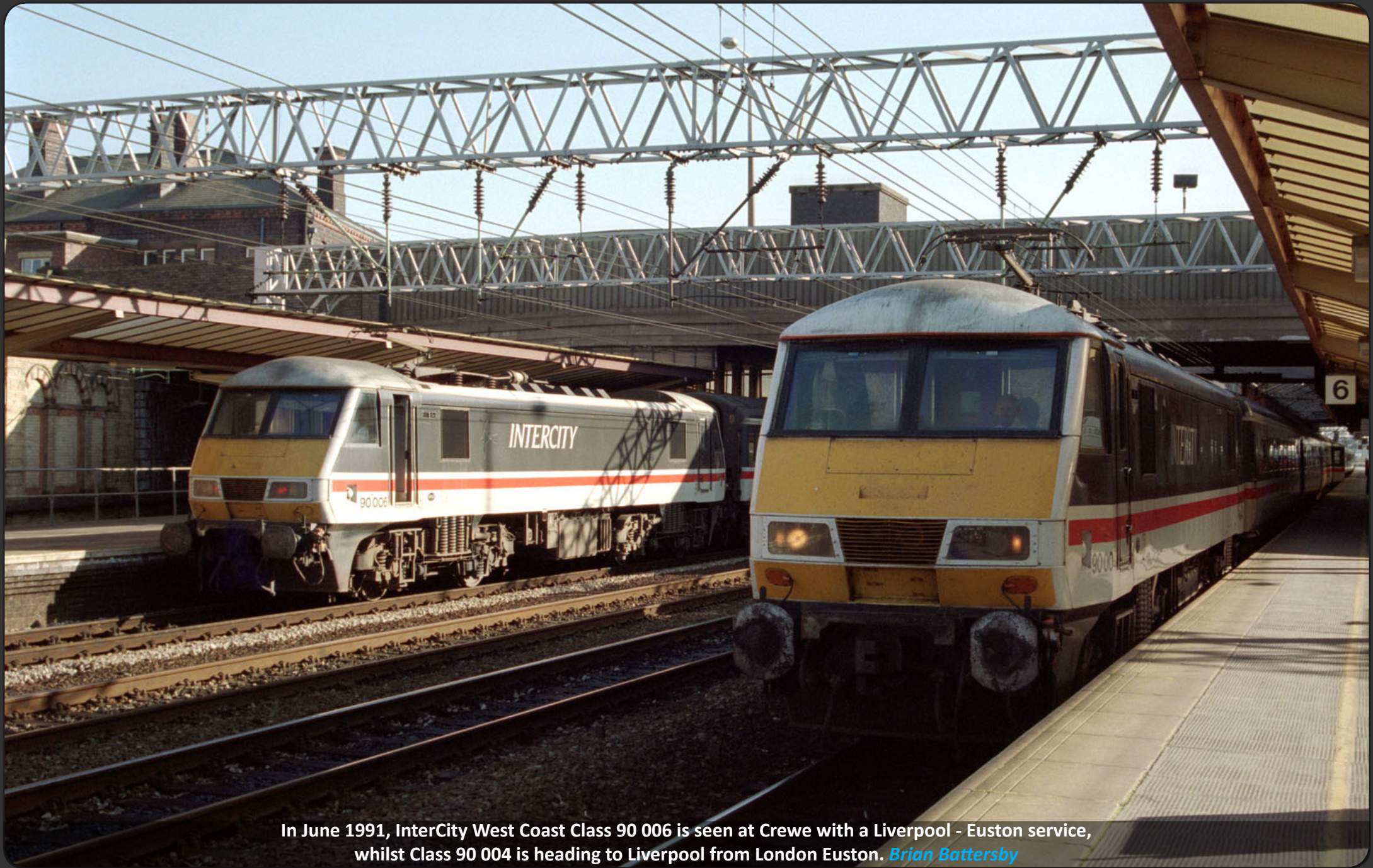
In June 1991, InterCity West Coast Class 90 006 is seen at Crewe with a Liverpool - Euston service, whilst Class 90 004 is heading to Liverpool from London Euston. Brian Battersby