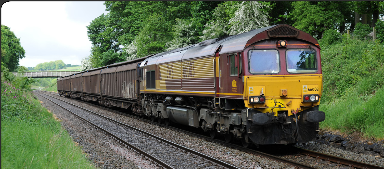
Top Left: Class 66 003 coasts through Pleasington on May 27th with 6N42 Warrington to Gilbraiths (Blackburn) trip working.