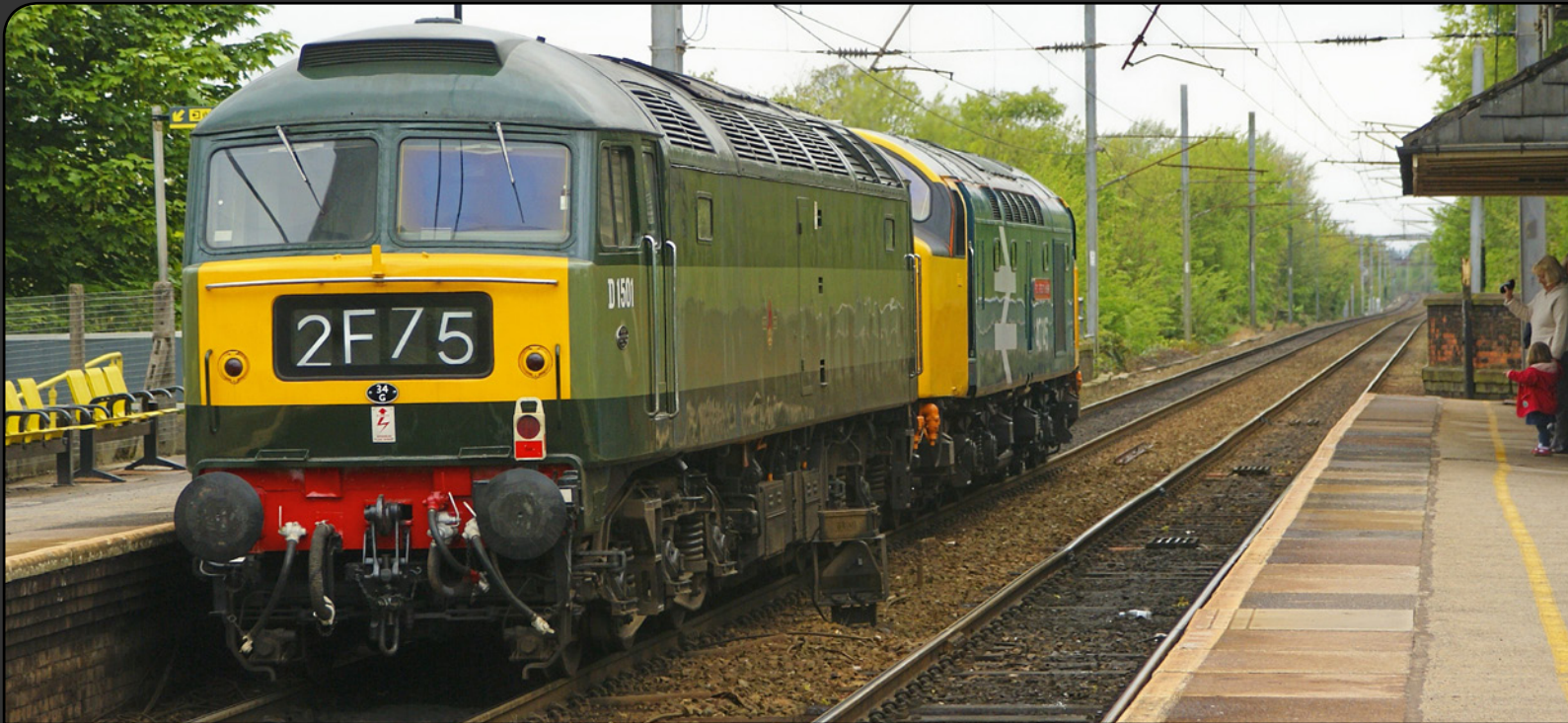
Top Left: Prior to working “The East Lancs Champion” railtour, Class 40 145 is seen working 0Z45 Heywood - Crewe through Newton-le-Willows and taking Class 47 No. D1501 to Crewe for repairs.