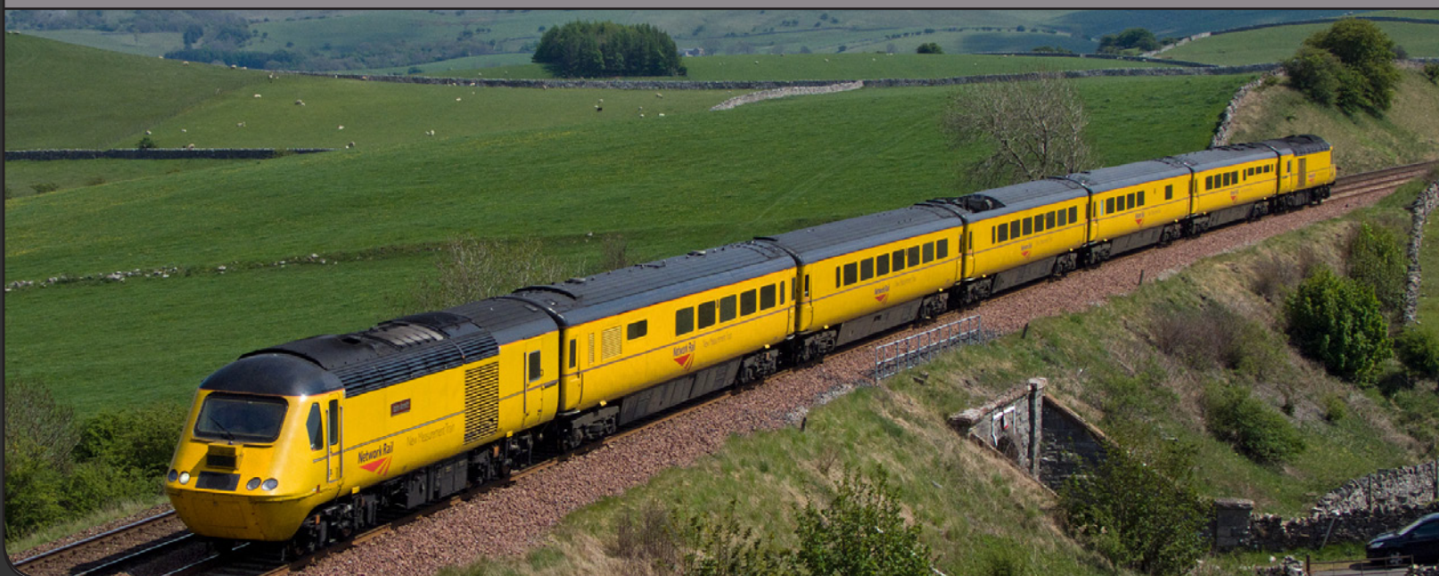
Bottom Left: Network Rail's NMT with 43013 and 43062 are seen working 1Q40 Derby - Heaton passed Waitby on May 22nd.