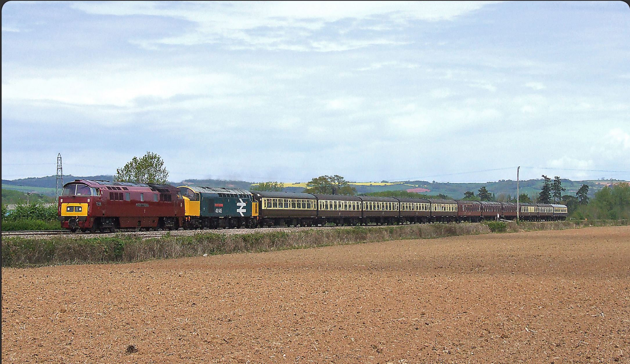
On May 15th, D1015 “Western Champion” and Class 40 145 “East Lancashire Railway” are seen near Victory Crossing powering the outward run of the Class 40 Preservation Society’s “The East Lancs Champion” railtour from Crewe to Penzance. This two day trip visited several branch lines in Cornwall and returned north the following day. Jonathan Gill