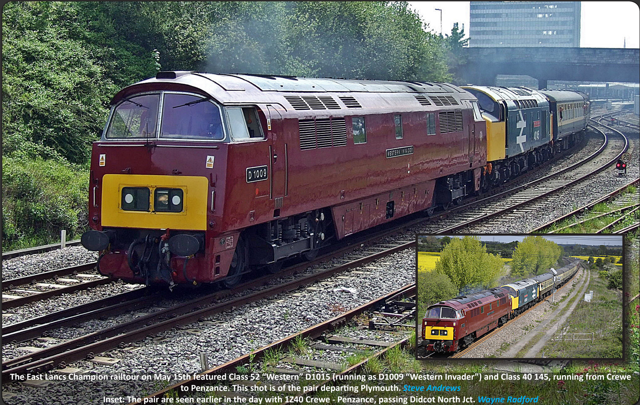
The East Lancs Champion railtour on May 15th featured Class 52 "Western" D1015 (running as D1009 "Western Invader") and Class 40 145, running from Crewe to Penzance. This shot is of the pair departing Plymouth. Steve Andrews Inset: The pair are seen earlier in the day with 1Z40 Crewe - Penzance, passing Didcot North Jct. Wayne Radford