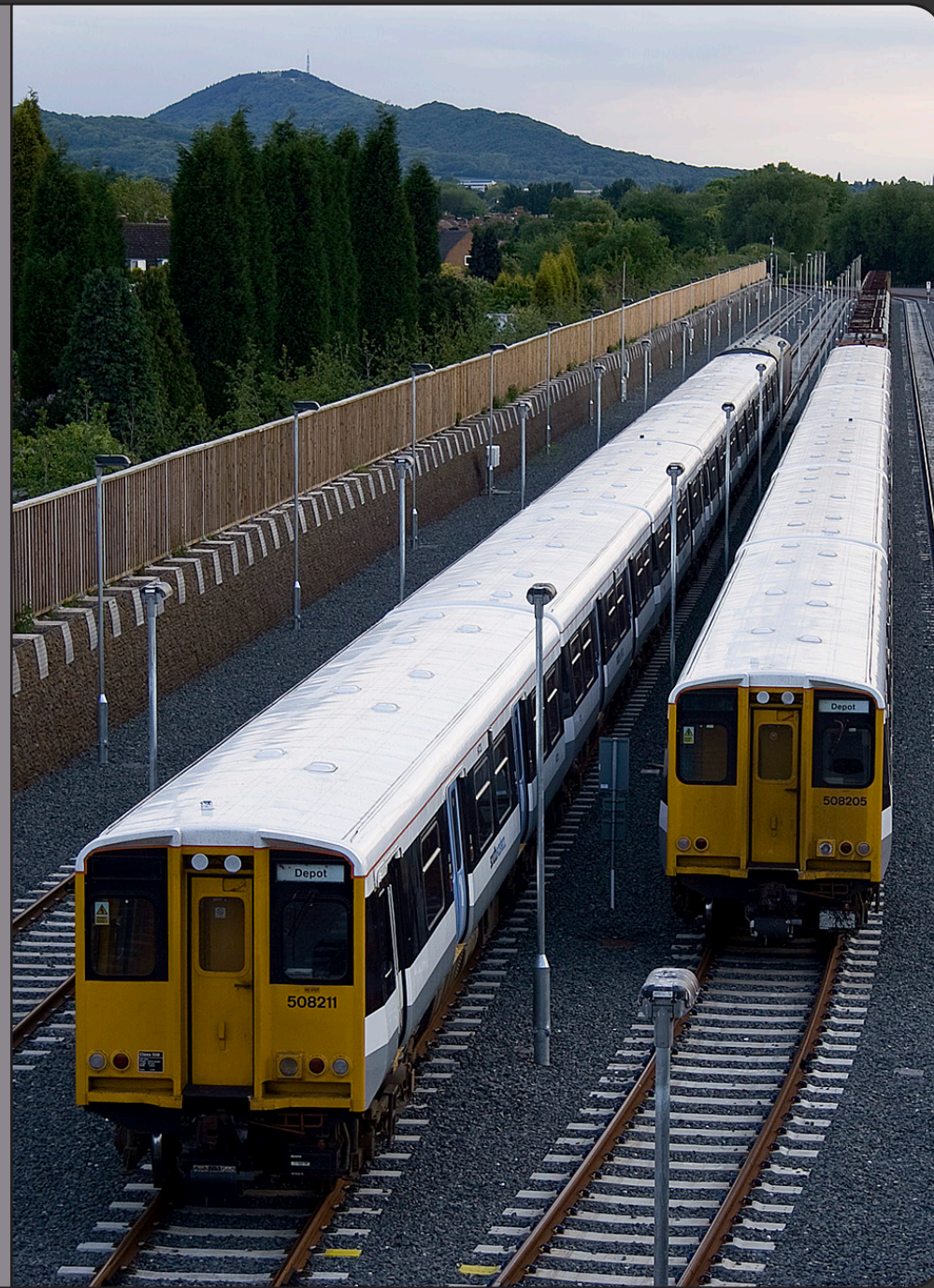
Right: Looking into the Railfreight Terminal at Telford, the Class 508s here so far are seen from the road bridge on May 28th.