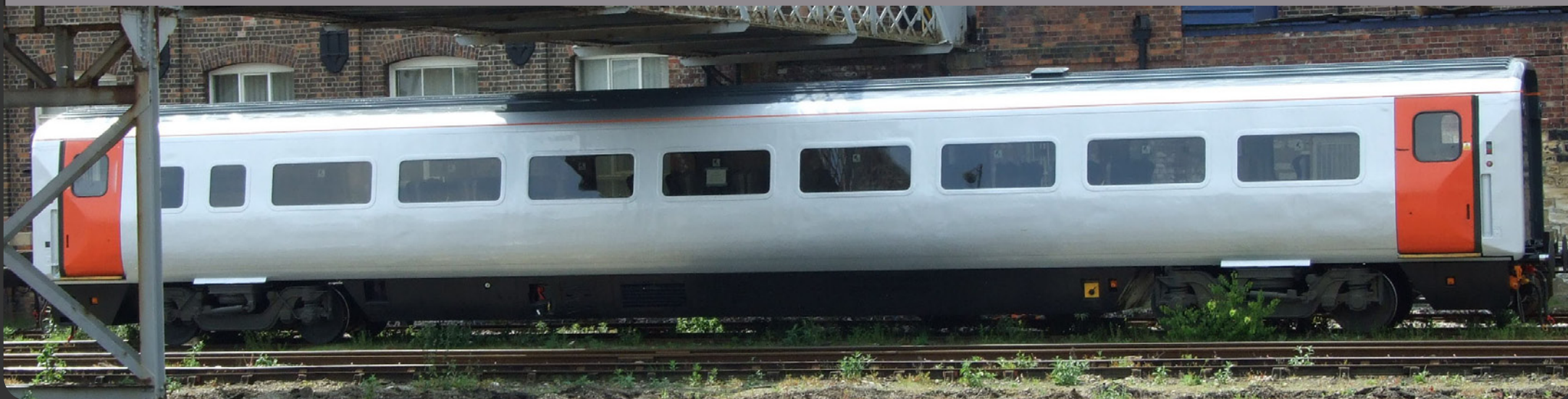
Photo: Is this the new East Coast Livery? A Mk 4 coach stands outside Wabtec Doncaster in May.

We believe this to be the best source of UK rail fares advice available anywhere, as we have a team of people who are familiar with the complex rail fares system who can help you. Never pay over the odds again, and ask us if you need help! See you there.