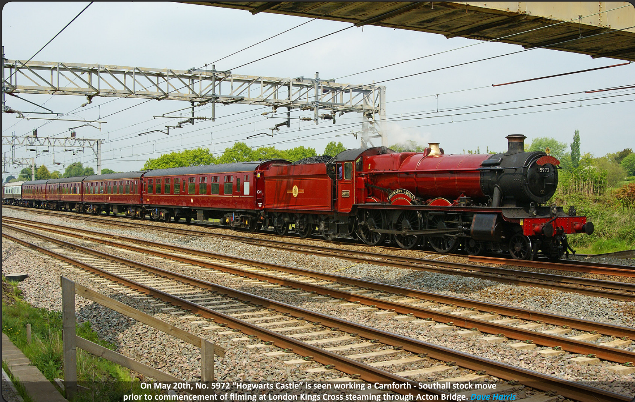
On May 20th, No. 5972 "Hogwarts Castle" is seen working a Carnforth - Southall stock move prior to commencement of filming at London Kings Cross steaming through Acton Bridge.