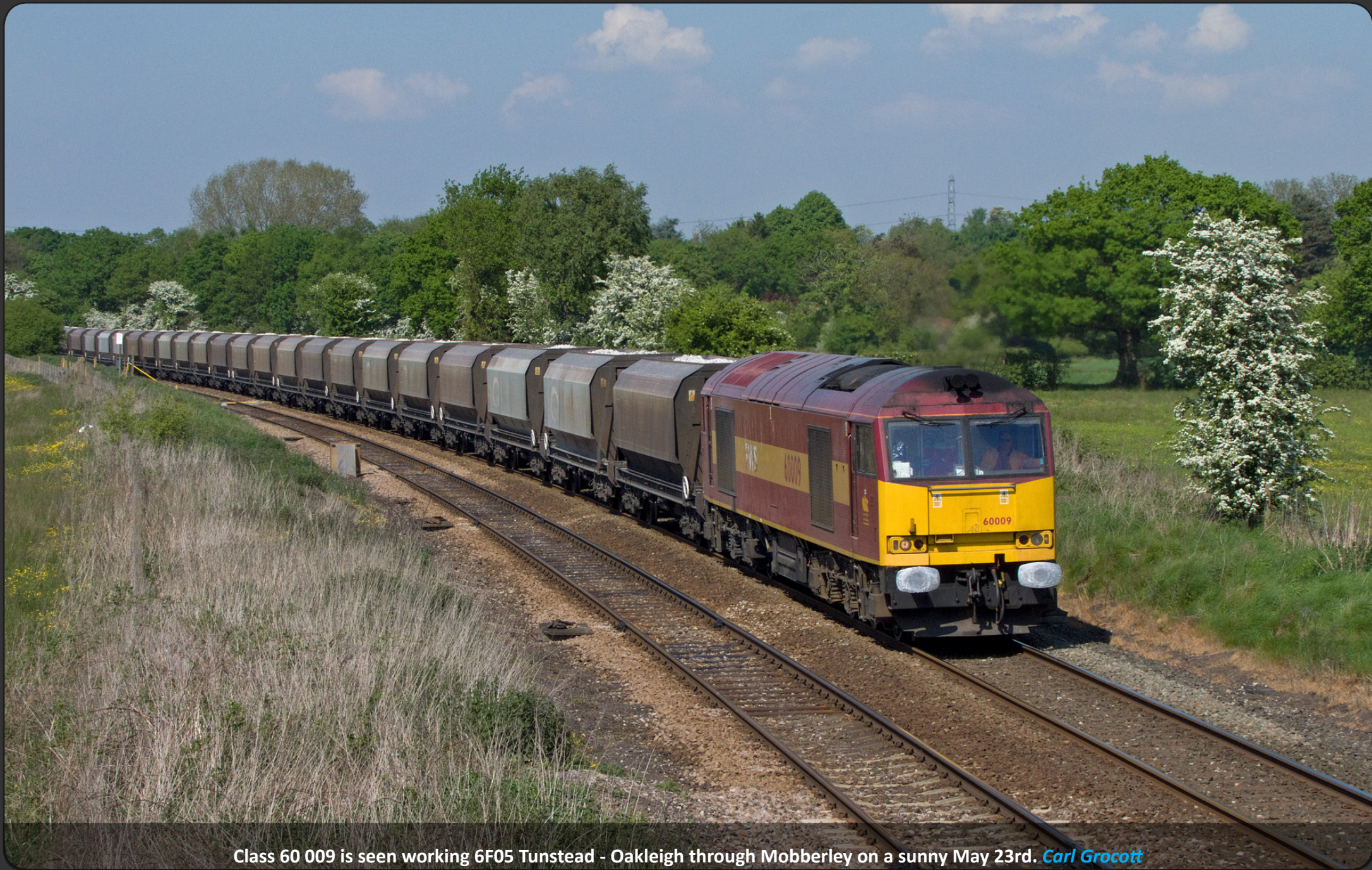
Class 60 009 is seen working 6F05 Tunstead - Oakleigh through Mobberley on a sunny May 23rd. Carl Grocott