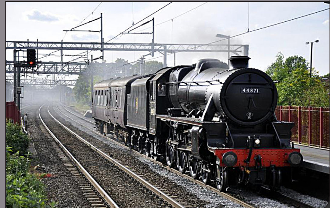
Bottom Right: Black five No. 44871 heads along the southern WCML on 5273 Heywood - Southall, passed Harrow & Wealdstone on May 21st. Wayne Radford