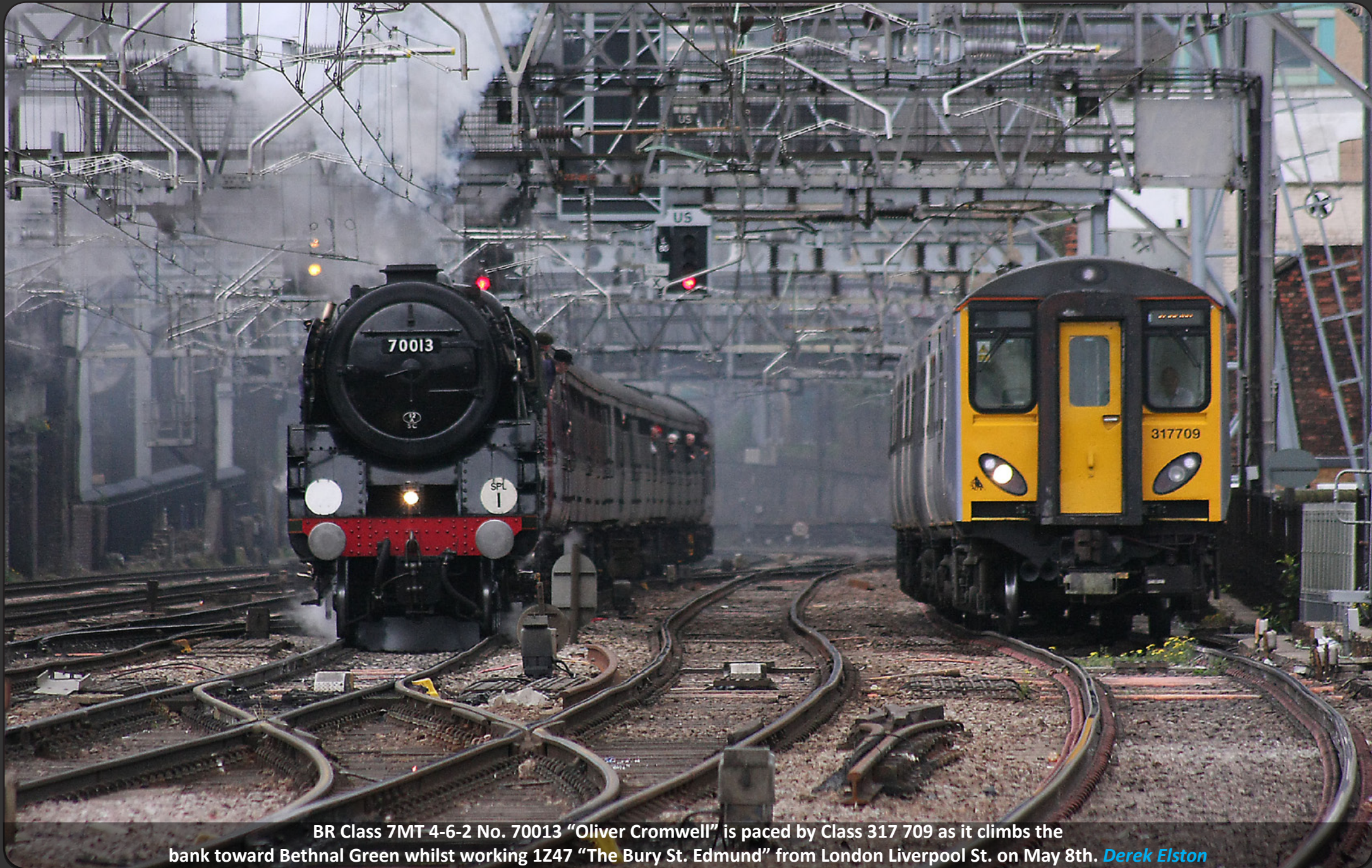
BR Class 7MT 4-6-2 No. 70013 "Oliver Cromwell" is paced by Class 317 709 as it climbs the bank toward Bethnal Green whilst working 1247 "The Bury St. Edmund" from London Liverpool St. on May 8th.