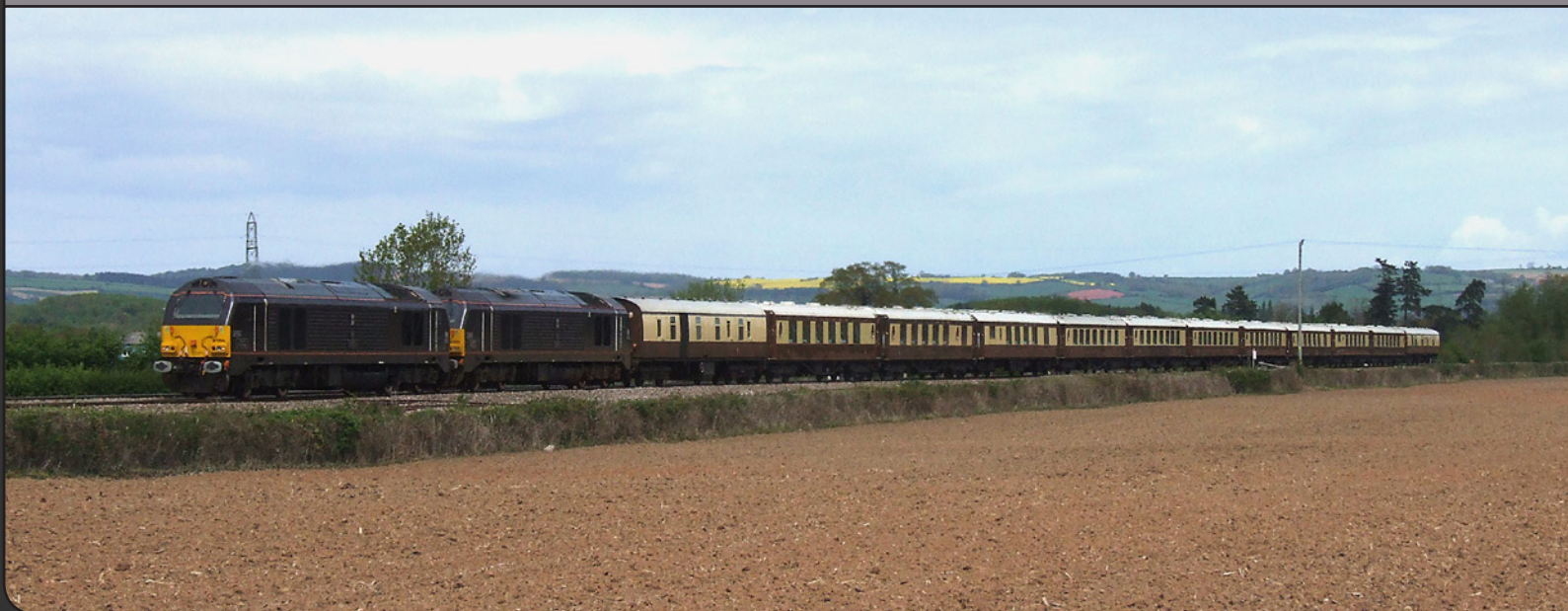
Bottom Left: On May 15th, Royal Train locos Class 67 005 & 67 006 are seen near Victory Crossing with the return working of a VSOE British Pullman luncheon trip from Plymouth to Taunton & return.