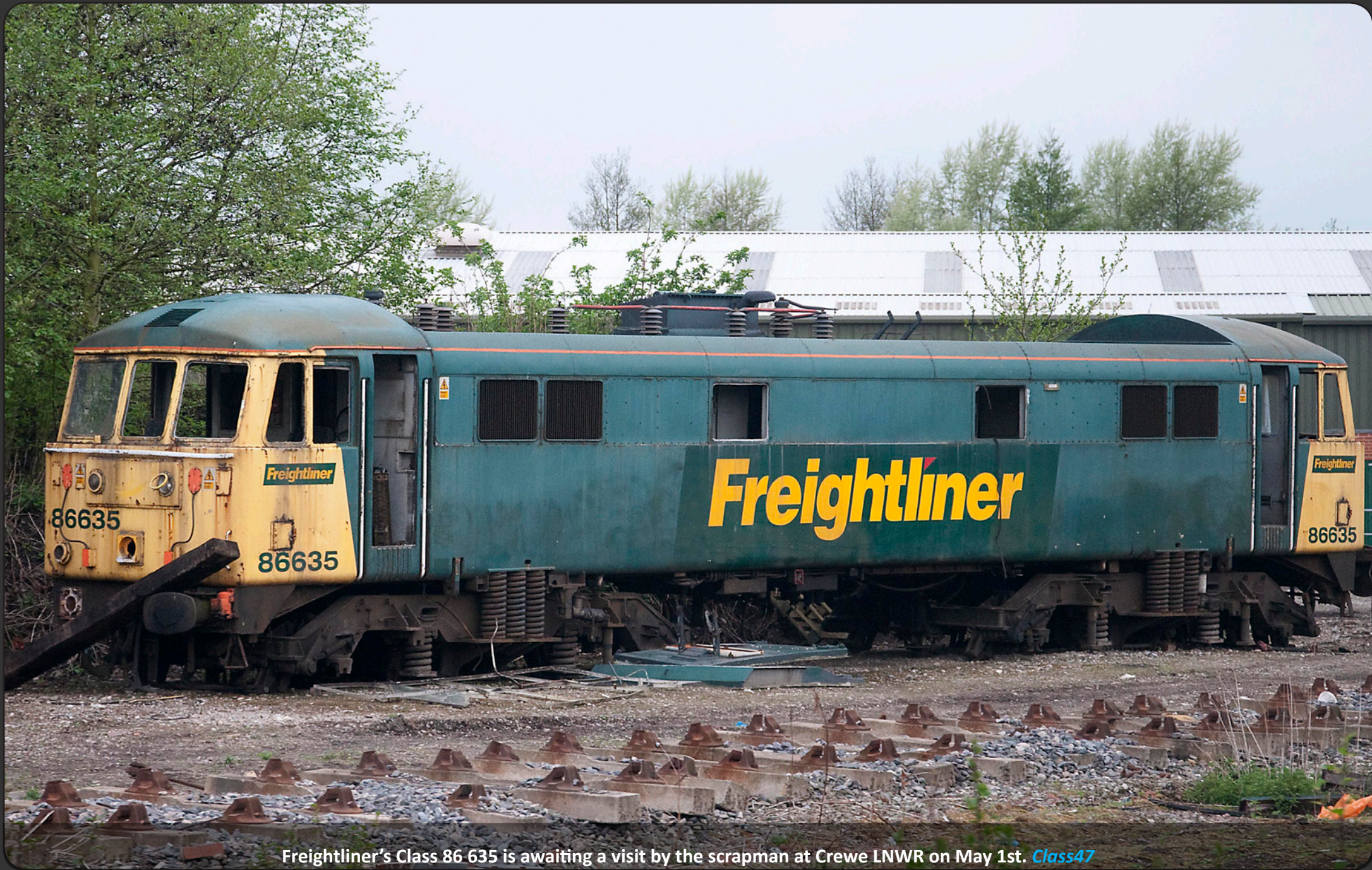
Freightliner's Class 86 635 is awaiting a visit by the scrapman at Crewe LNWR on May 1st.