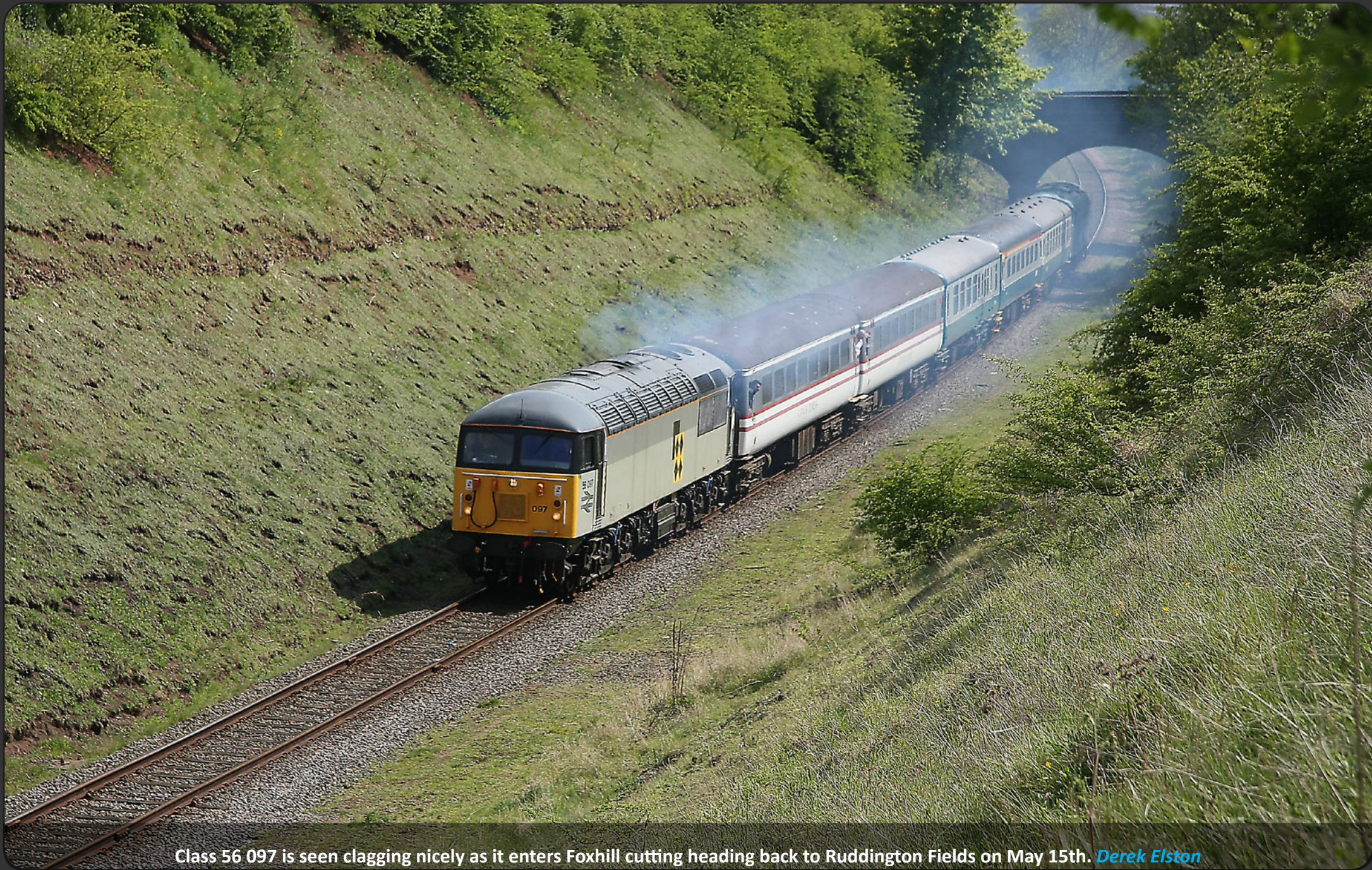
Class 56 097 is seen clagging nicely as it enters Foxhill cutting heading back to Ruddington Fields on May 15th. Derek Elston