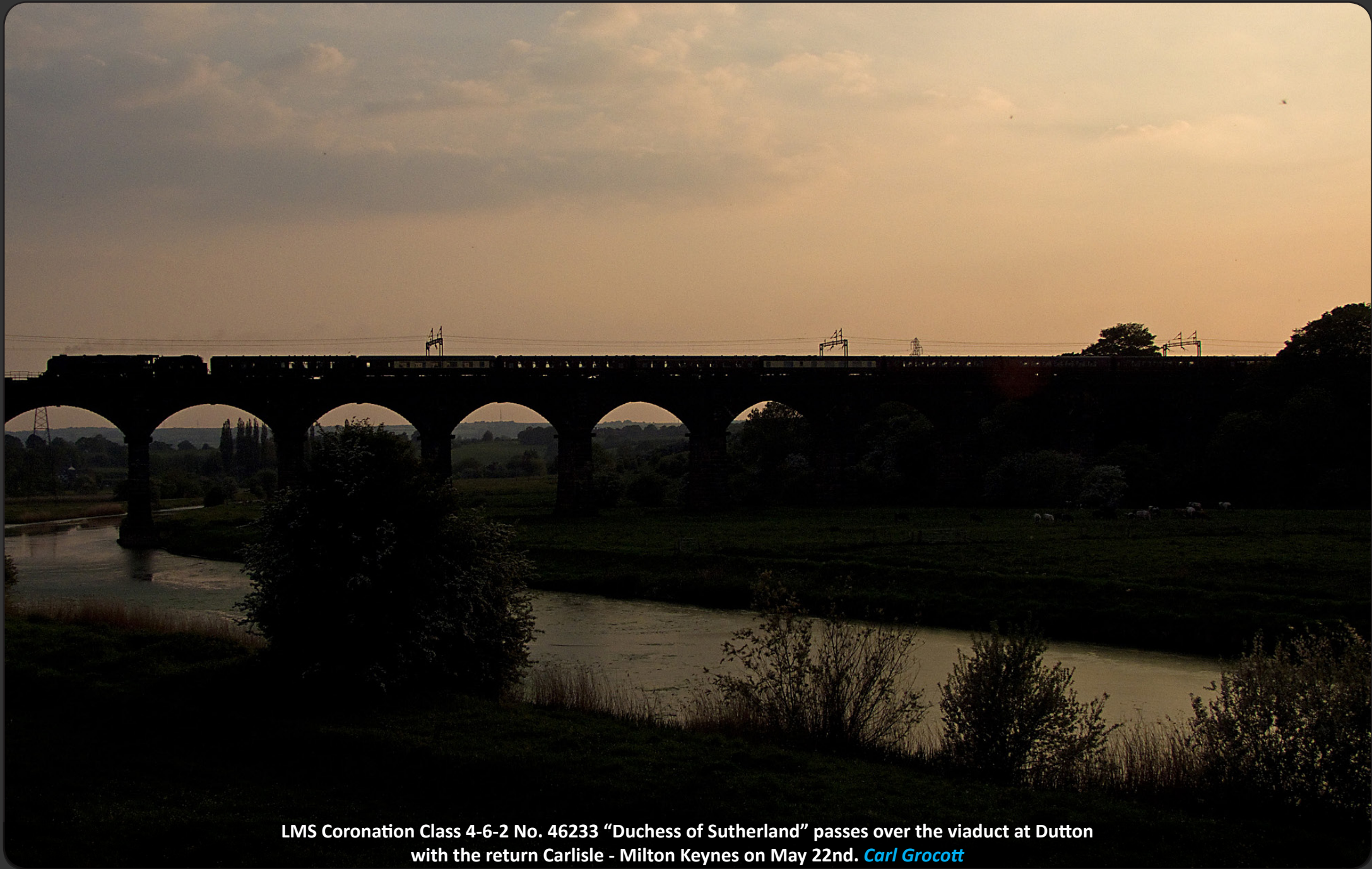
LMS Coronation Class 4-6-2 No. 46233 "Duchess of Sutherland" passes over the viaduct at Dutton with the return Carlisle - Milton Keynes on May 22nd.