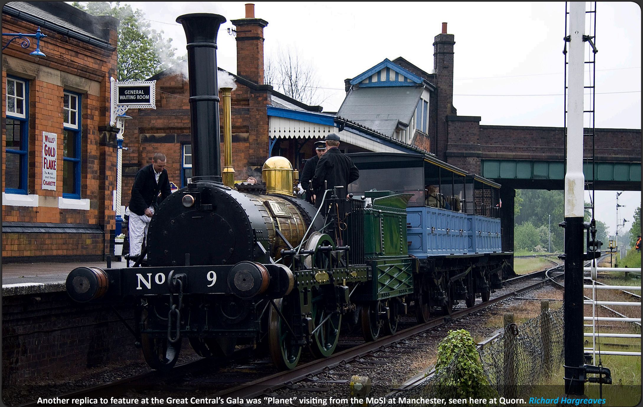
Another replica to feature at the Great Central's Gala was "Planet" visiting from the MoSI at Manchester, seen here at Quorn.