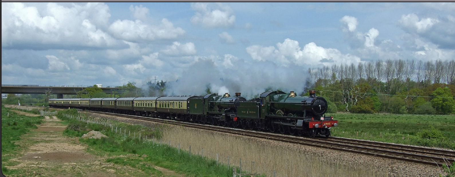
Bottom Left: Another shot from "The Cornishman" railtour on May 15th, which from Birmingham to Plymouth and featured GWR Hall Class No. 4965 "Rood Ashton Hall" and GWR 4073 Class No. 5043 "Earl of Mount Edgcumbe", seen here on the outward leg, passing Exminster.