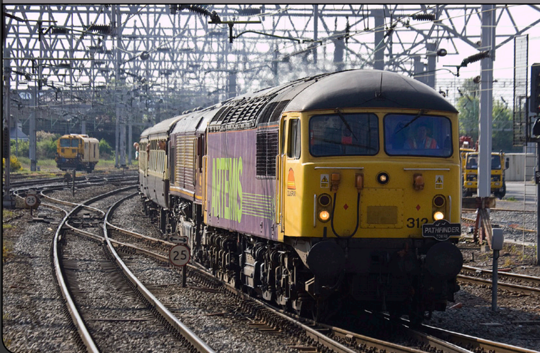
Below: Hanson Traction's Class 56 312 passes through the site of the station at Gisburn, Lancashire with DBS 66 148 in tow and the 1266 Bristol Temple Meads - Carlisle railtour on May 22nd.