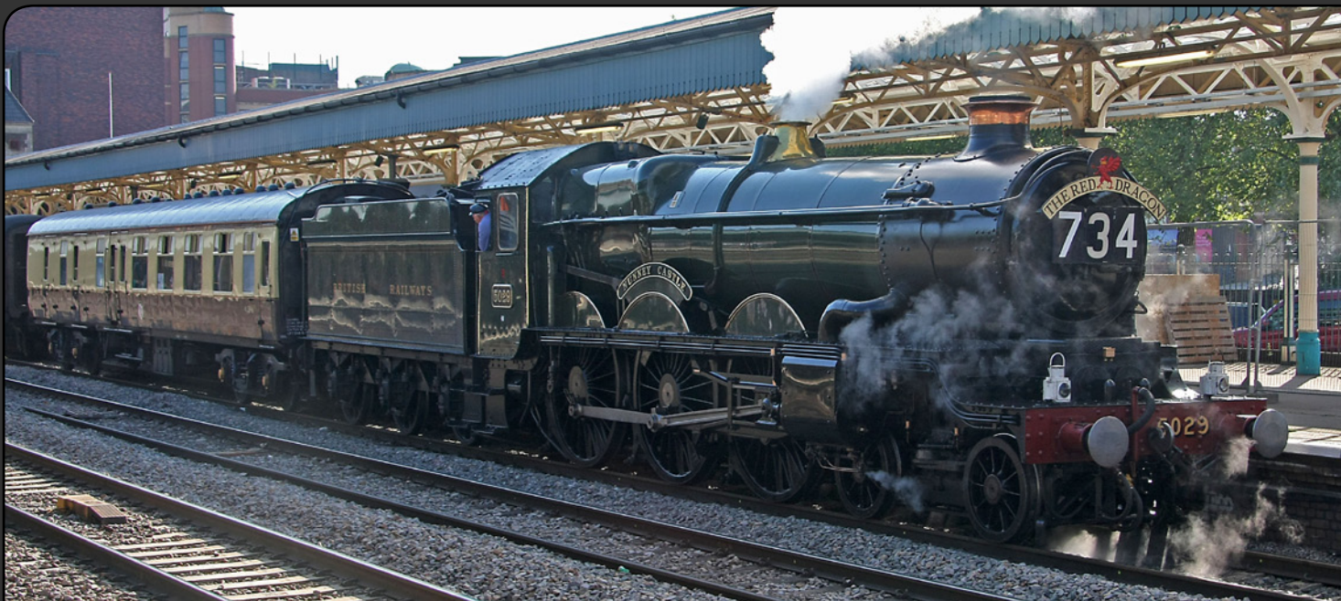
Left: GWR Castle Class 4-6-0 No. 5029 "Nunney Castle" bearing the Red Dragon headboard backs onto the Railway Touring Company's Southern Irishman at Newport on May 22nd.