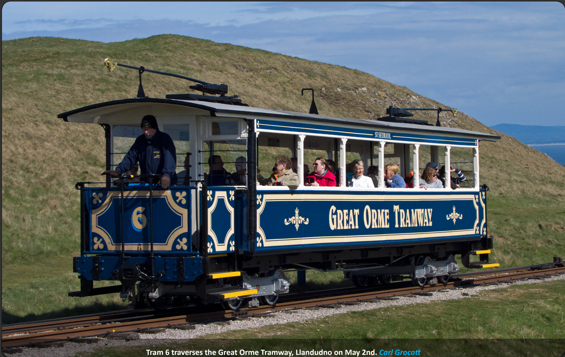
Tram 6 traverses the Great Orme Tramway, Llandudno on May 2nd. Carl Grocott