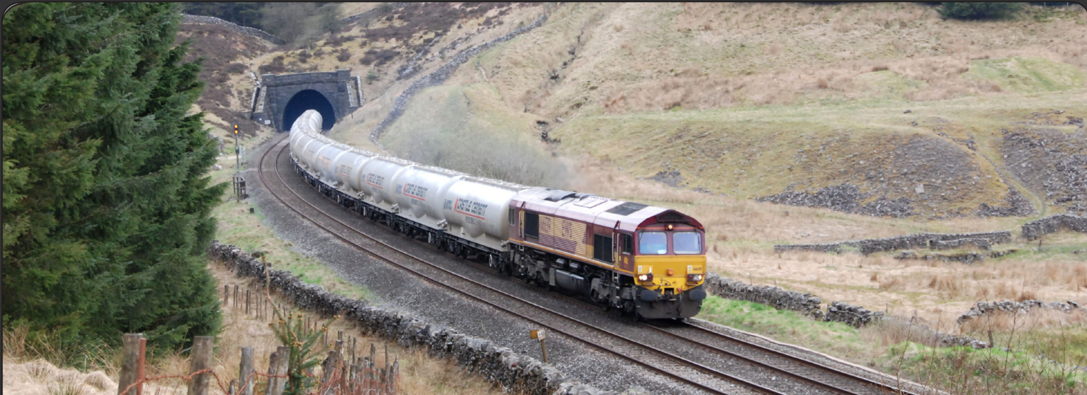
Above: Class 66 139 works 6S00 Clitheroe to Mossend cement train through Blea Moor tunnel on April 28th.