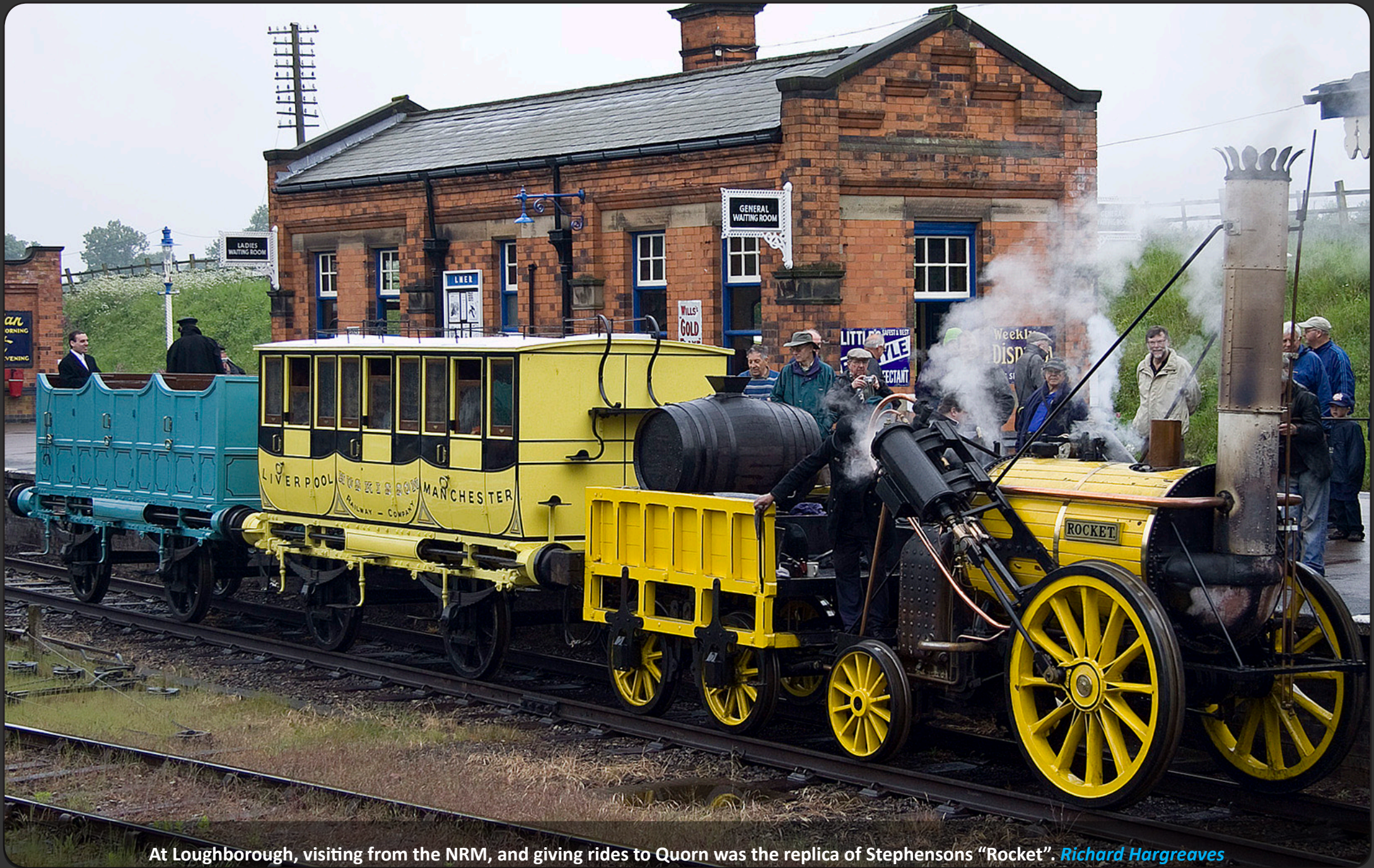
At Loughborough, visiting from the NRM, and giving rides to Quorn was the replica of Stephenson's "Rocket".