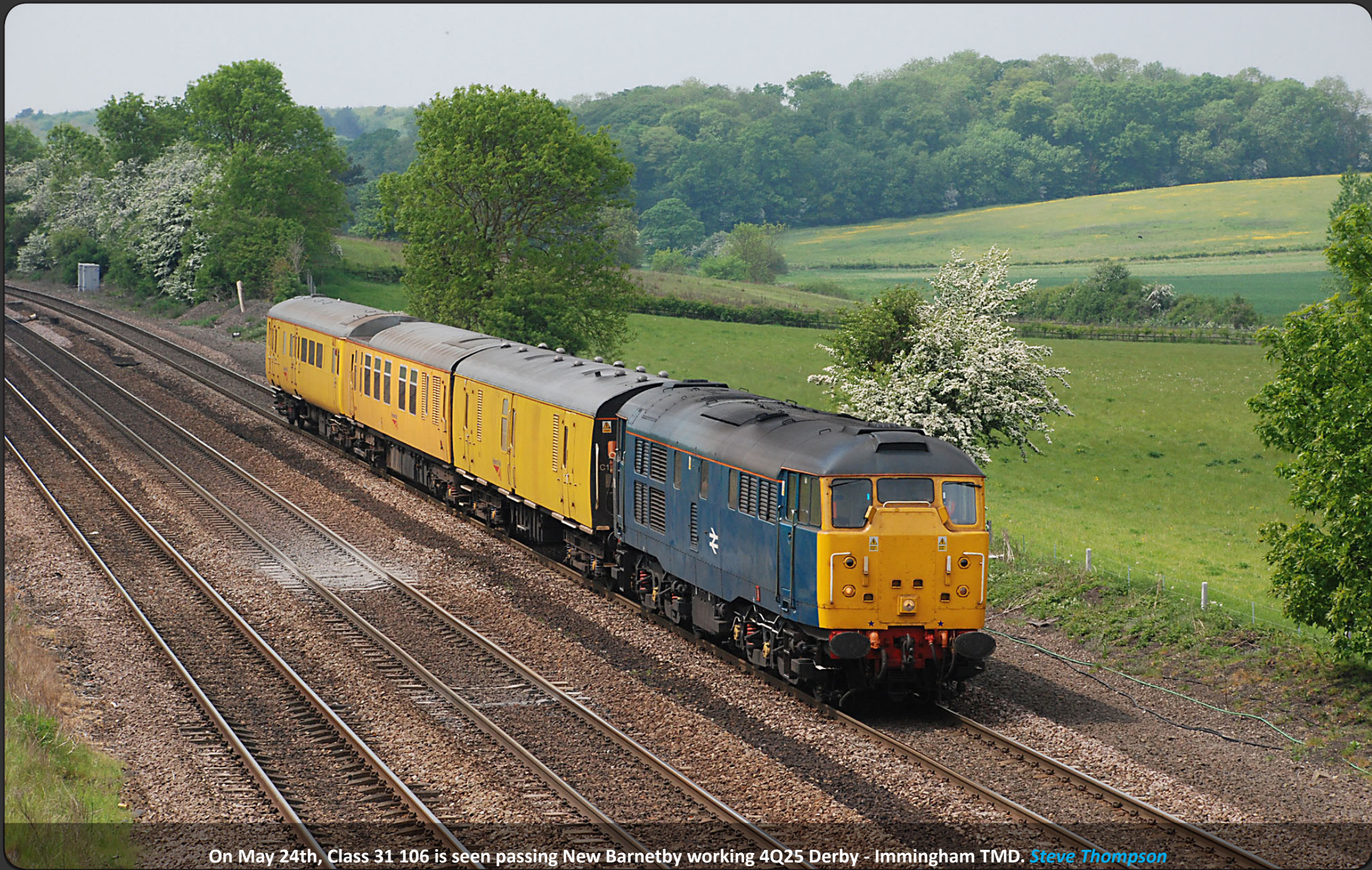
On May 24th, Class 31 106 is seen passing New Barnetby working 4Q25 Derby - Immingham TMD.