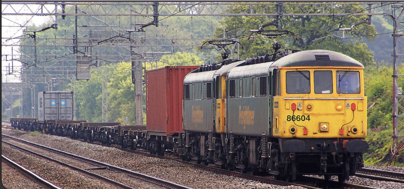
Left: Freightliner's Class 86 604 and 86 628 haul the 4M52 Felixstowe - Ditton through Acton Bridge on May 20th.