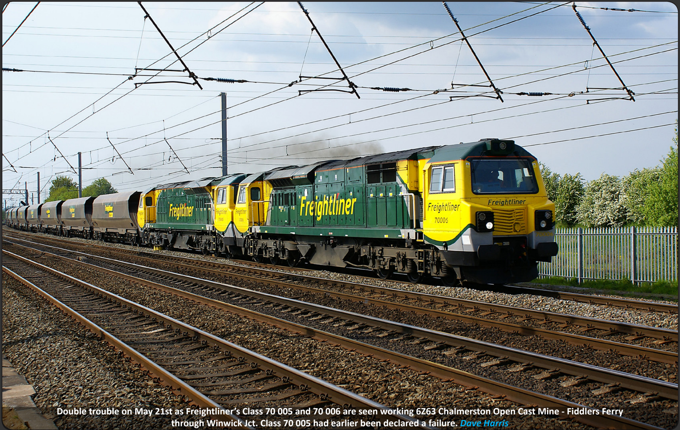
Double trouble on May 21st as Freightliner's Class 70 005 and 70 006 are seen working 6Z63 Chalmerston Open Cast Mine - Fiddlers Ferry through Winwick Jct. Class 70 005 had earlier been declared a failure.