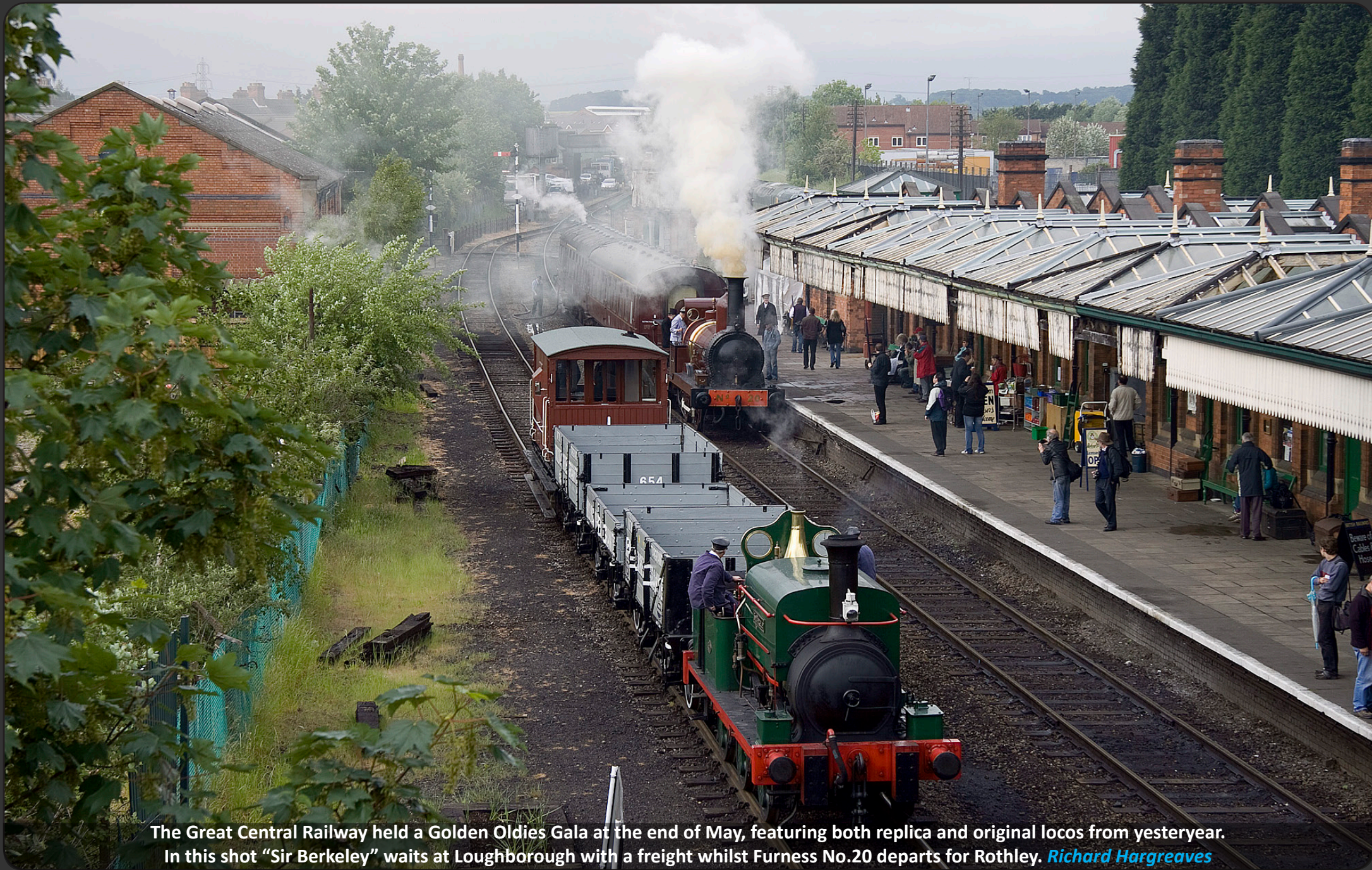
The Great Central Railway held a Golden Oldies Gala at the end of May, featuring both replica and original locos from yesteryear. In this shot "Sir Berkeley" waits at Loughborough with a freight whilst Furness No.20 departs for Rothley.