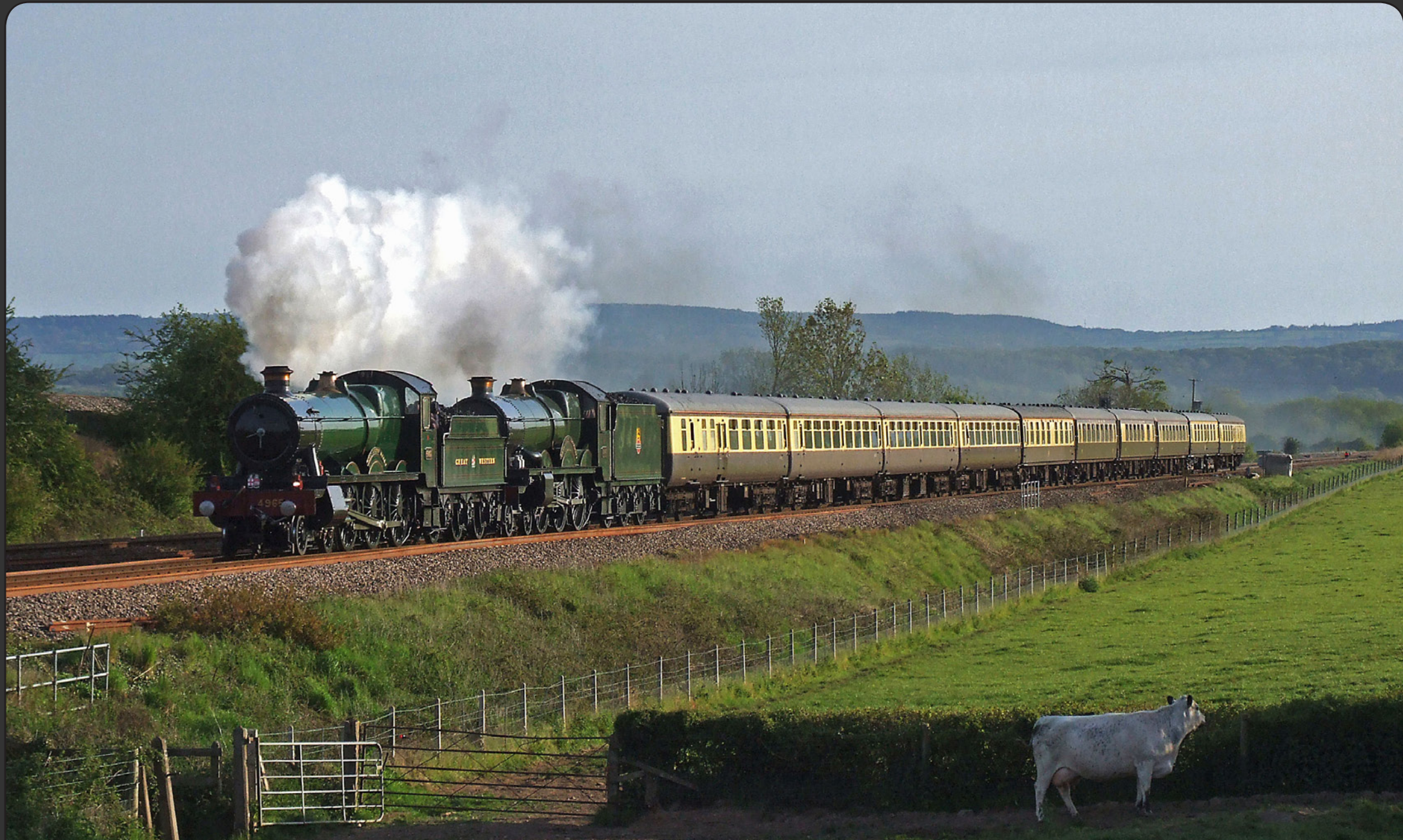
On May 15th, a cow stands oblivious as in bright evening sunshine as GWR 4-6-0s Nos. 4965 "Rood Ashton Hall" & 5043 "Earl of Mount Edgumbe" storm north past Cogload Jct. with the return run of Vintage Trains' "The Cornishman" charter from Plymouth as far as Bristol Temple Meads.