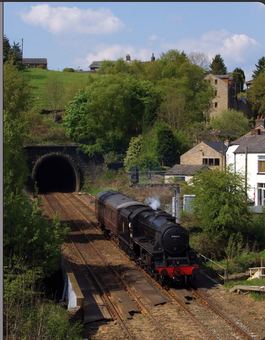
Right: On May 18th LMS Class 5MT 4-6-0 No. 44871 is seen passing Walsden, North Yorks working from Grosmont NYMR to Bury ELR.