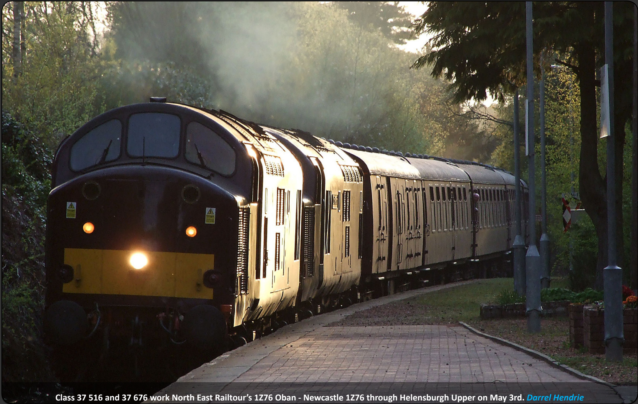
Class 37 516 and 37 676 work North East Railtour's 1276 Oban - Newcastle 1276 through Helensburgh Upper on May 3rd. Darrel Hendrie