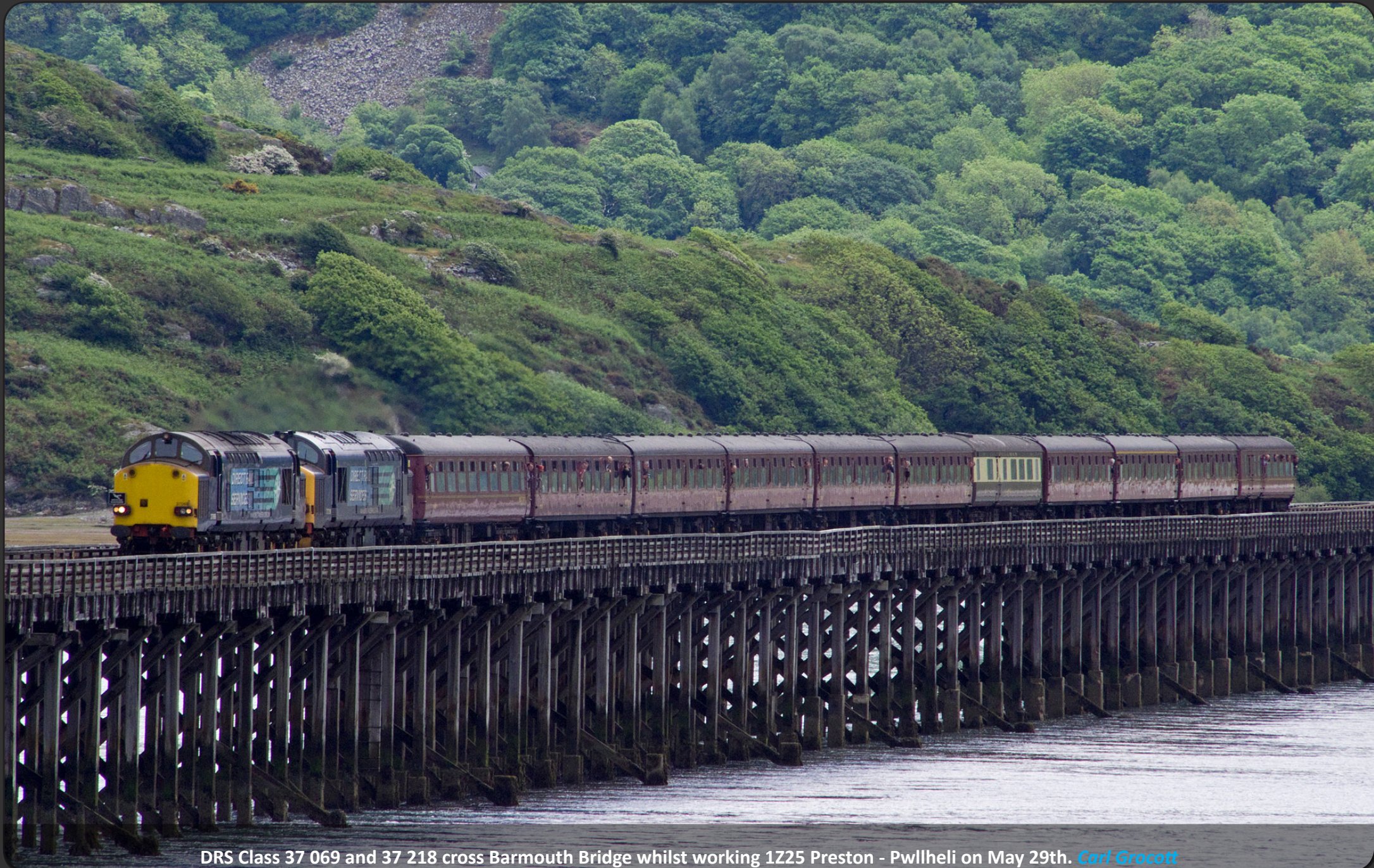
DRS Class 37 069 and 37 218 cross Barmouth Bridge whilst working 1Z25 Preston - Pwllheli on May 29th. Carl Grocott