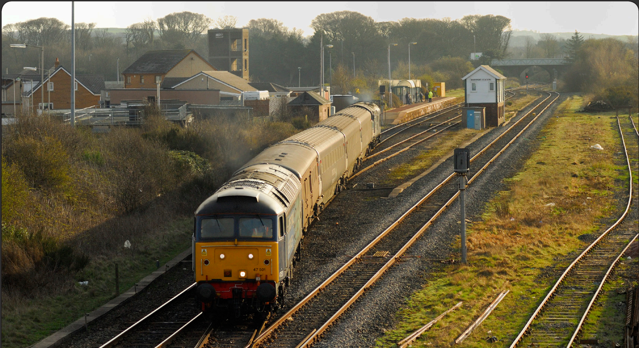
In November 2009, severe flooding caused the collapse of road bridges at Workington, Cumbria. With commuters having a lengthy diversion to cross the river, the government employed DRS to run a free passenger shuttle service between Maryport and Workington. On the morning of April 16th, the 5220 Carlisle Kingmoor to Workington empty carriage stock working ran very late, was terminated at Maryport instead of continuing all the way to Workington, and the first north-bound shuttle was cancelled. Even so, the first south-bound shuttle also ran late: Here we see Class 47 501 leading the 2219 to Workington out of Maryport. Class 37 607 was the locomotive at the north end of the train. In late May 2010 one bridge re-opened and the "Floodexs" ceased. Gary S. Smith