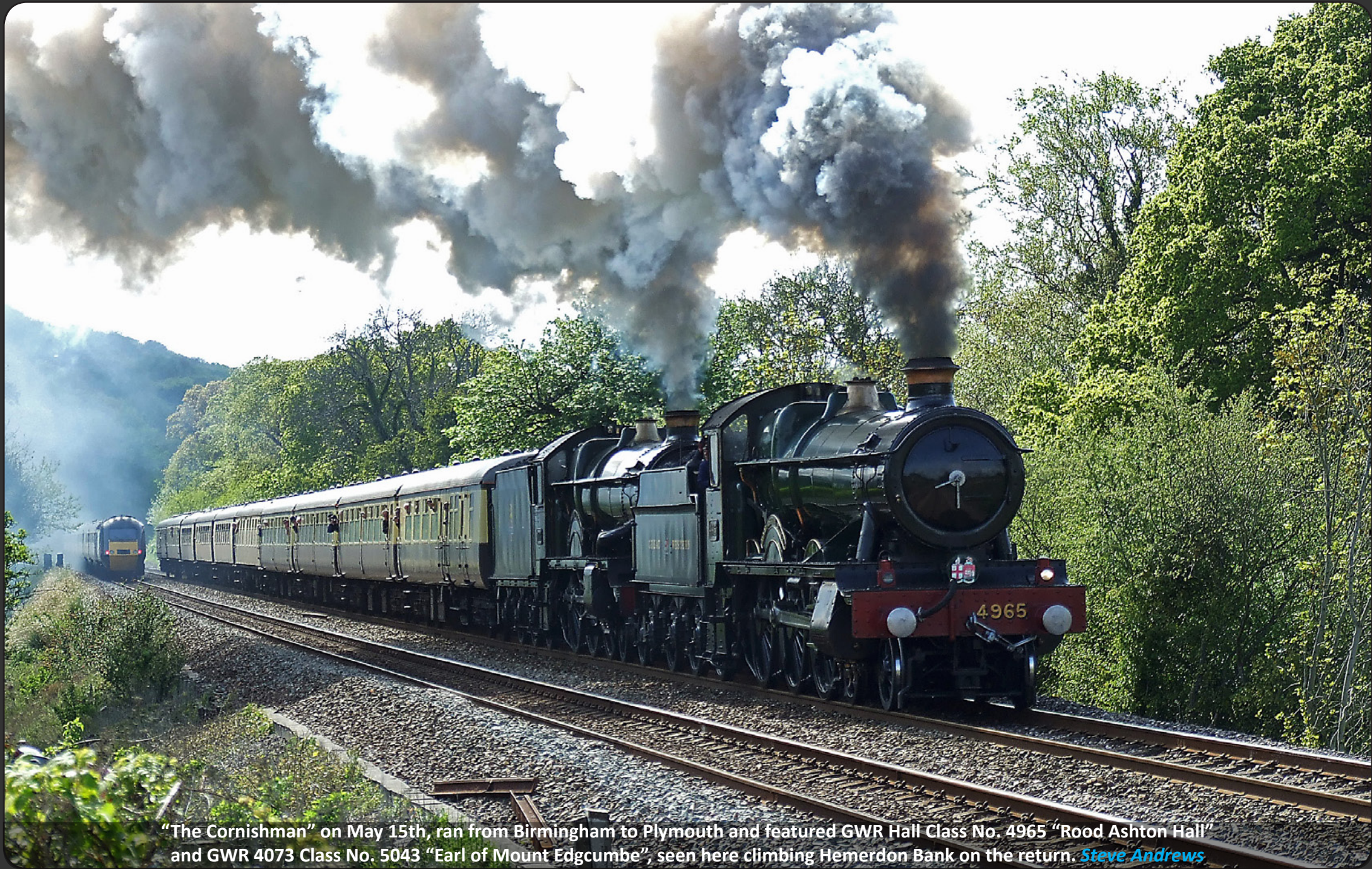
"The Cornishman" on May 15th, ran from Birmingham to Plymouth and featured GWR Hall Class No. 4965 "Rood Ashton Hall" and GWR 4073 Class No. 5043 "Earl of Mount Edgcumbe", seen here climbing Hemerdon Bank on the return.