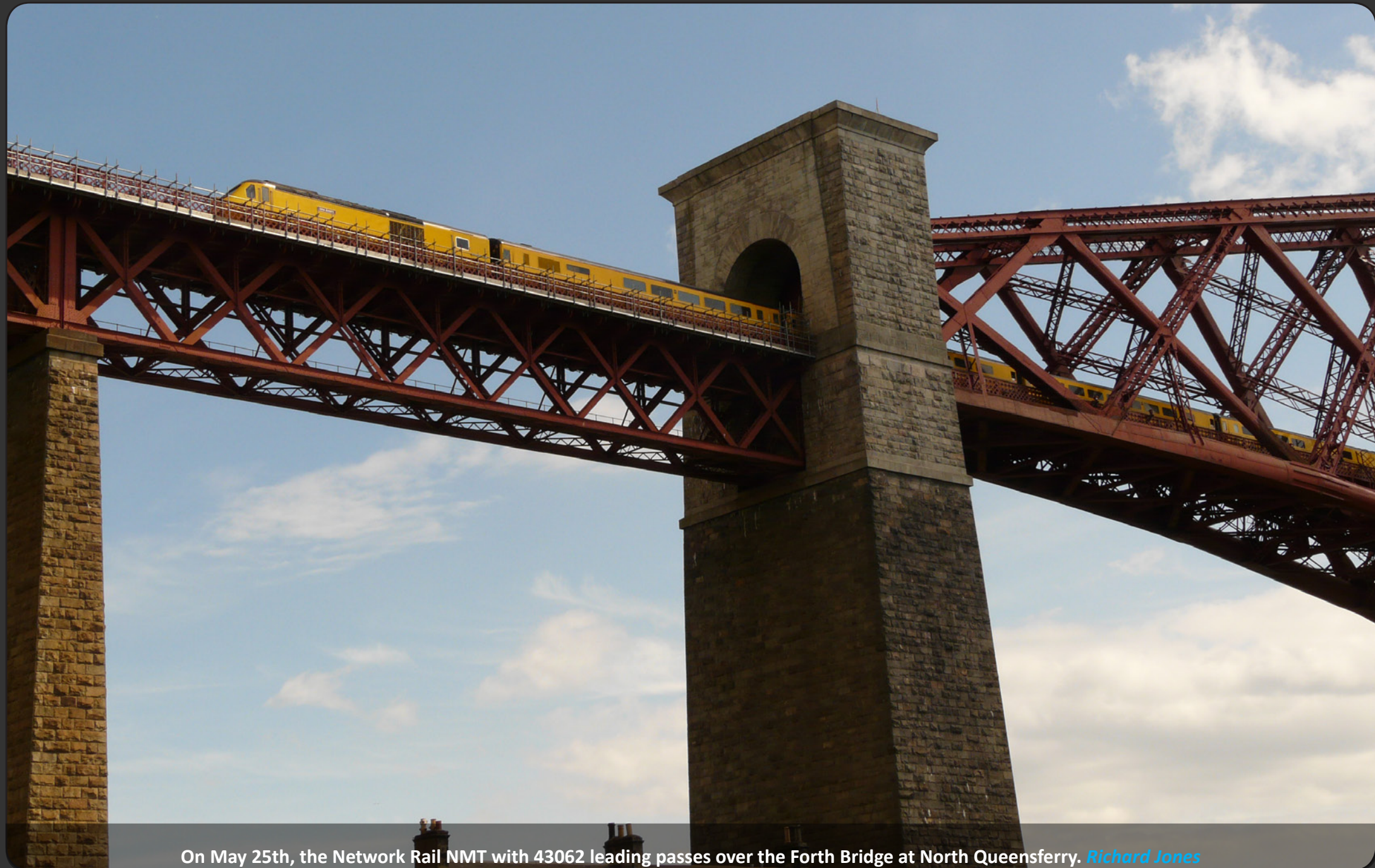
On May 25th, the Network Rail NMT with 43062 leading passes over the Forth Bridge at North Queensferry.