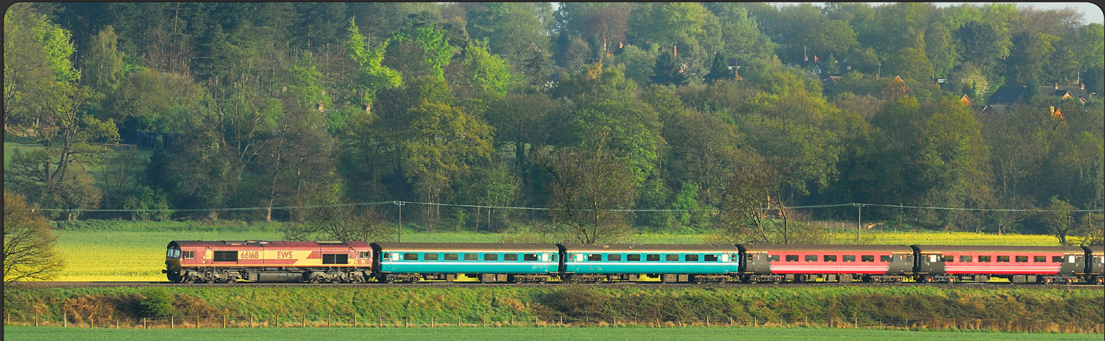
Above: Bringing colour to Cannock Chase with an assortment of rolling stock, DBS Class 66 168 climbs past Slitting Mill with the 1266 Stafford - Cardiff Central railtour early on the morning of May 1st.