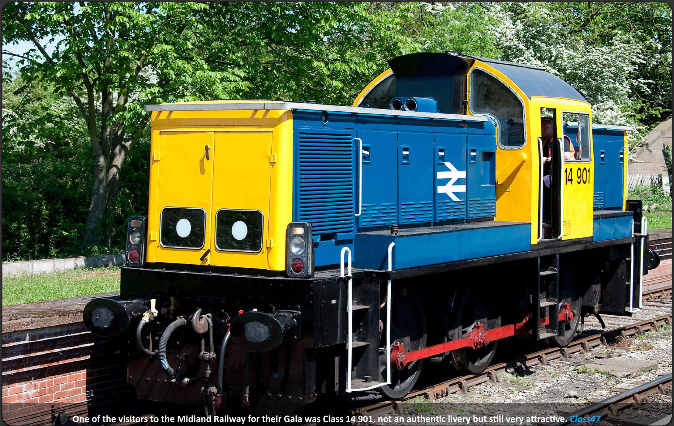
One of the visitors to the Midland Railway for their Gala was Class 14 901, not an authentic livery but still very attractive. Class47