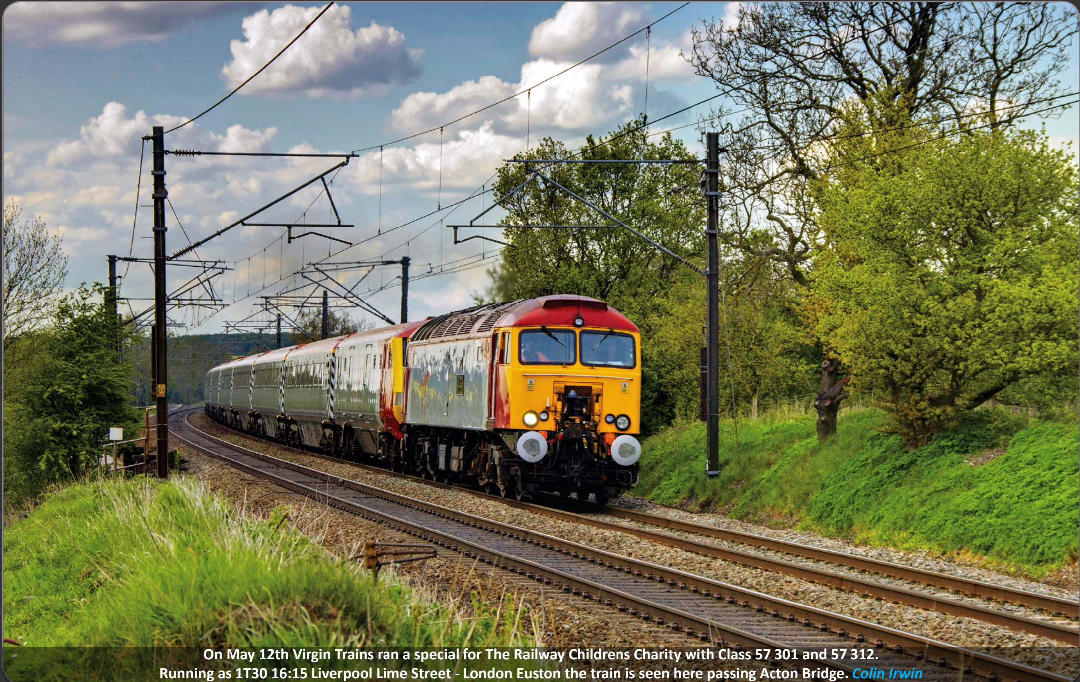
On May 12th Virgin Trains ran a special for The Railway Childrens Charity with Class 57 301 and 57 312. Running as 1T30 16:15 Liverpool Lime Street - London Euston the train is seen here passing Acton Bridge. Colin Irwin