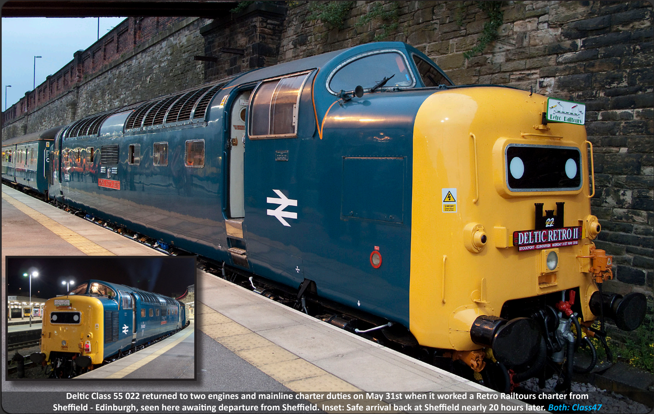
Deltic Class 55 022 returned to two engines and mainline charter duties on May 31st when it worked a Retro Railtours charter from Sheffield - Edinburgh, seen here awaiting departure from Sheffield. Inset: Safe arrival back at Sheffield nearly 20 hours later. Both: Class47