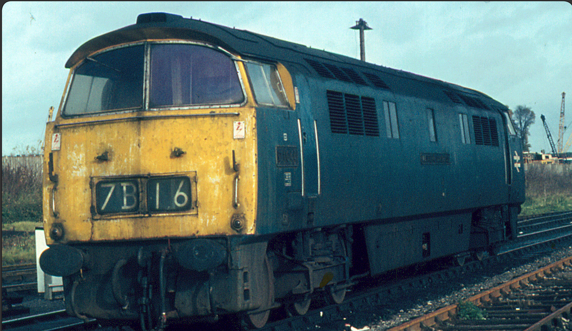
On a visit to Westbury on November 10th 1974, D1044 Western Duchess stands on the depot yard waiting its next duty. By this time, the locomotives were known as Class 52s and the "D" had been painted out on most of the number places. During the 1970's, the Class 52's were the main power for the Merehead and Whatley Quarries stone trains and the Maybach power certainly was taken at full strength working the gradient from Westbury towards Warminster.