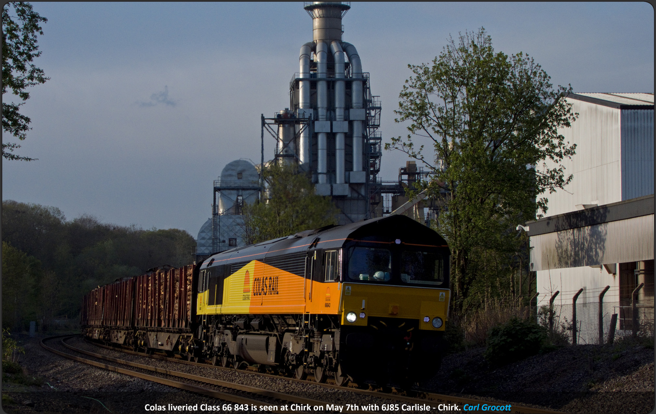
Colas liveried Class 66 843 is seen at Chirk on May 7th with 6J85 Carlisle - Chirk.