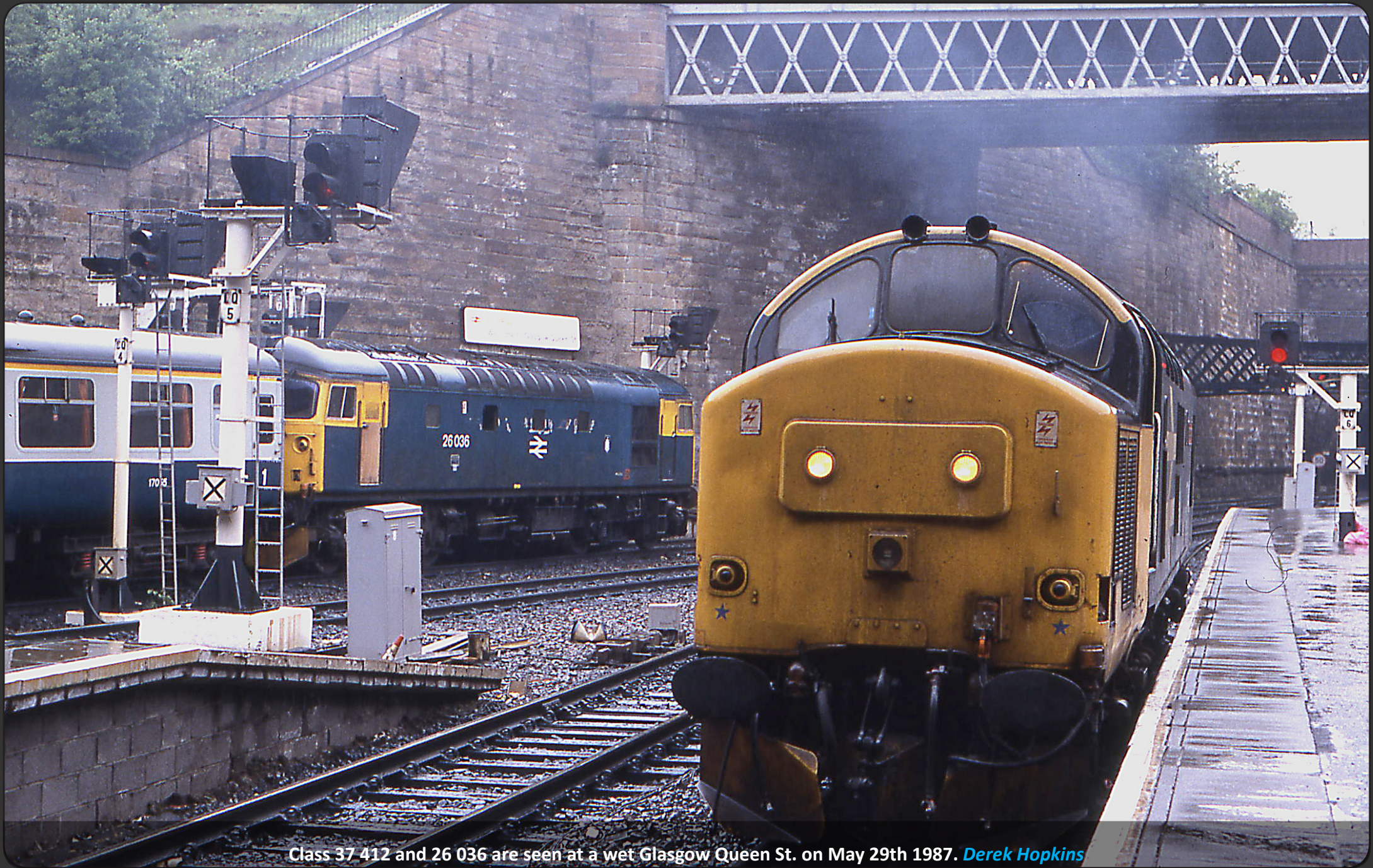
Class 37 412 and 26 036 are seen at a wet Glasgow Queen St. on May 29th 1987. Derek Hopkins