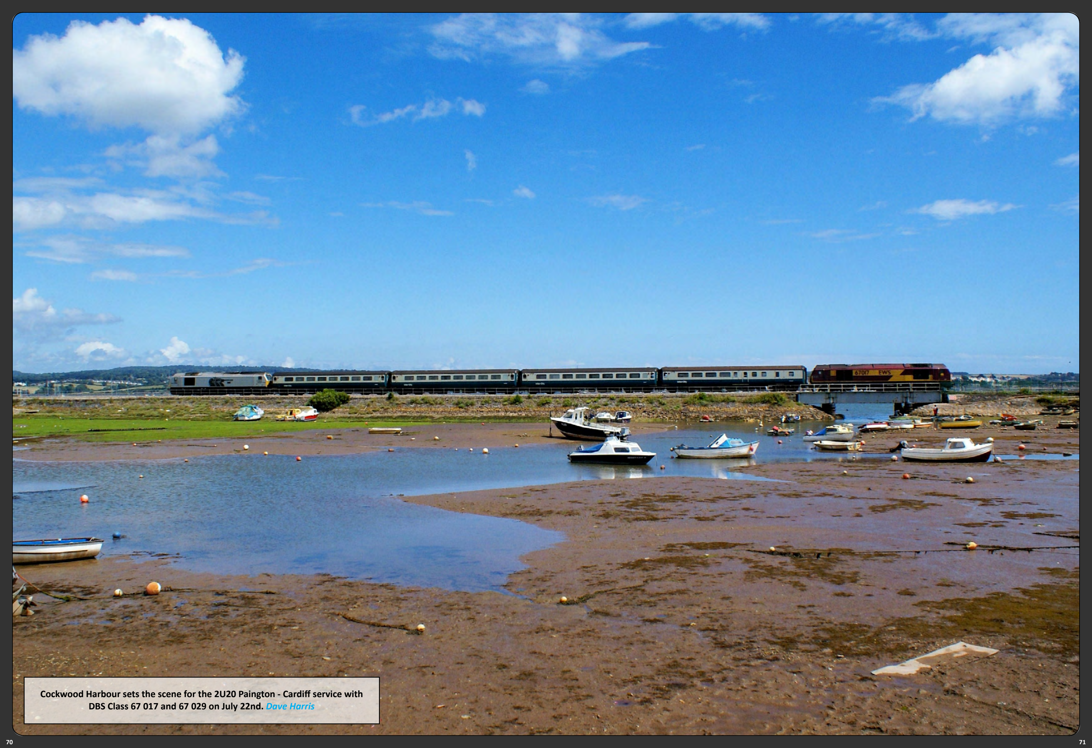
Cockwood Harbour sets the scene for the 2U20 Paington - Cardiff service with DBS Class 67 017 and 67 029 on July 22nd.