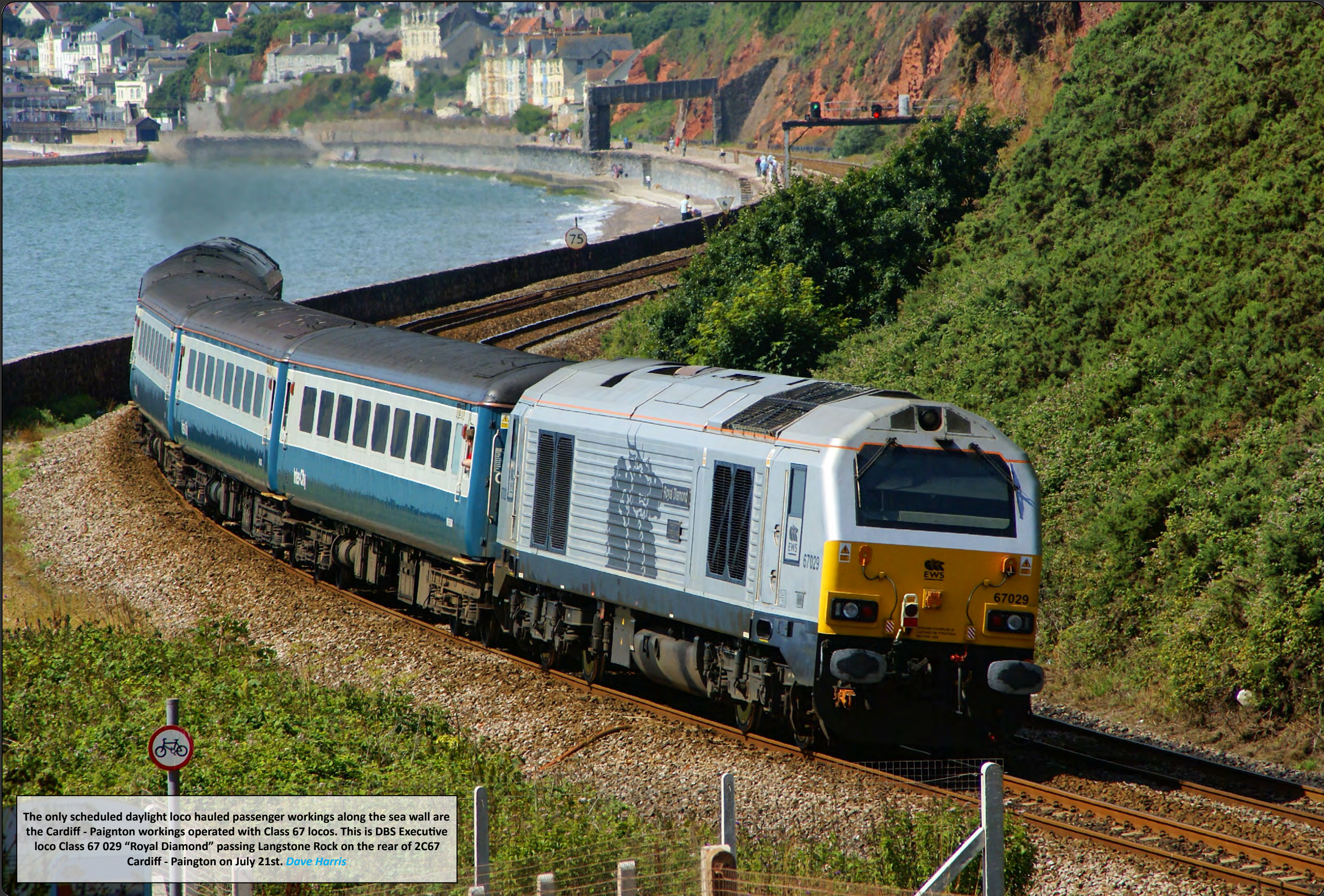
The only scheduled daylight loco hauled passenger workings along the sea wall are the Cardiff - Paignton workings operated with Class 67 locos. This is DBS Executive loco Class 67 029 "Royal Diamond" passing Langstone Rock on the rear of 2C67 Cardiff - Paignton on July 21st. Dave Harris