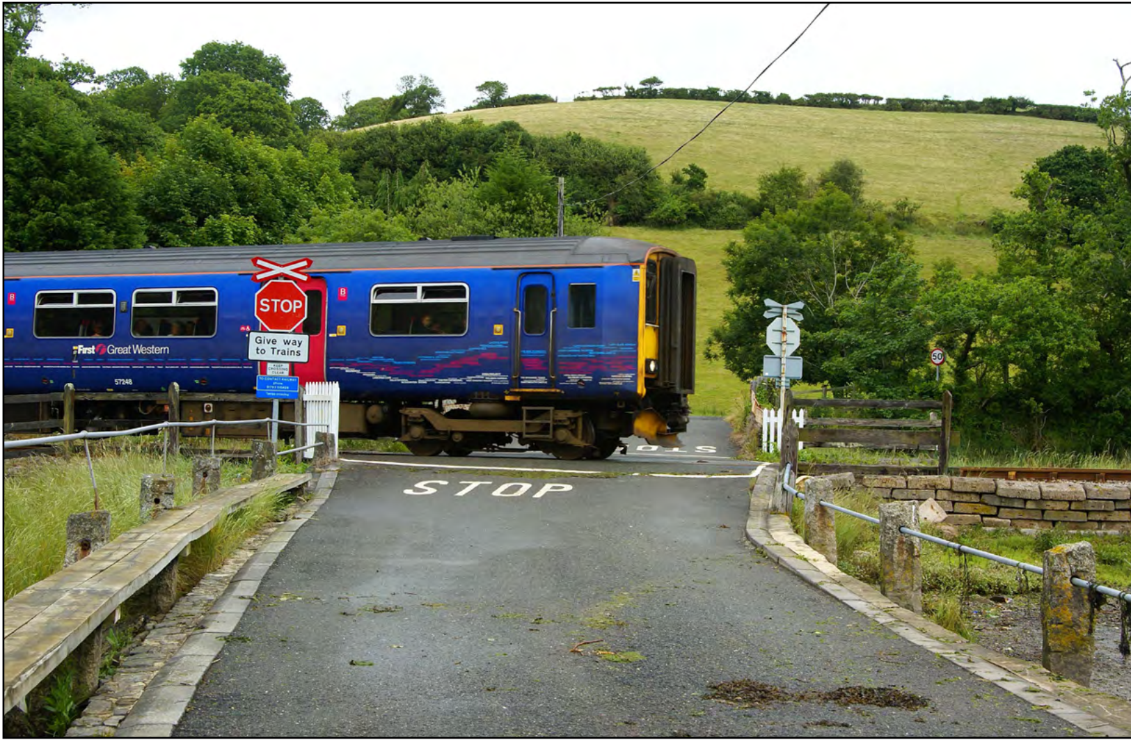
Above: On July 13th, FGW Class 150 248 negotiates the un manned and un gated level crossing near Sandplace on the Looe Valley line. Debris from the recent high tide is evident. Below: Class 67 017 heads past Langstone Rock with the 2C67 Cardiff - Paington service on July 20th.