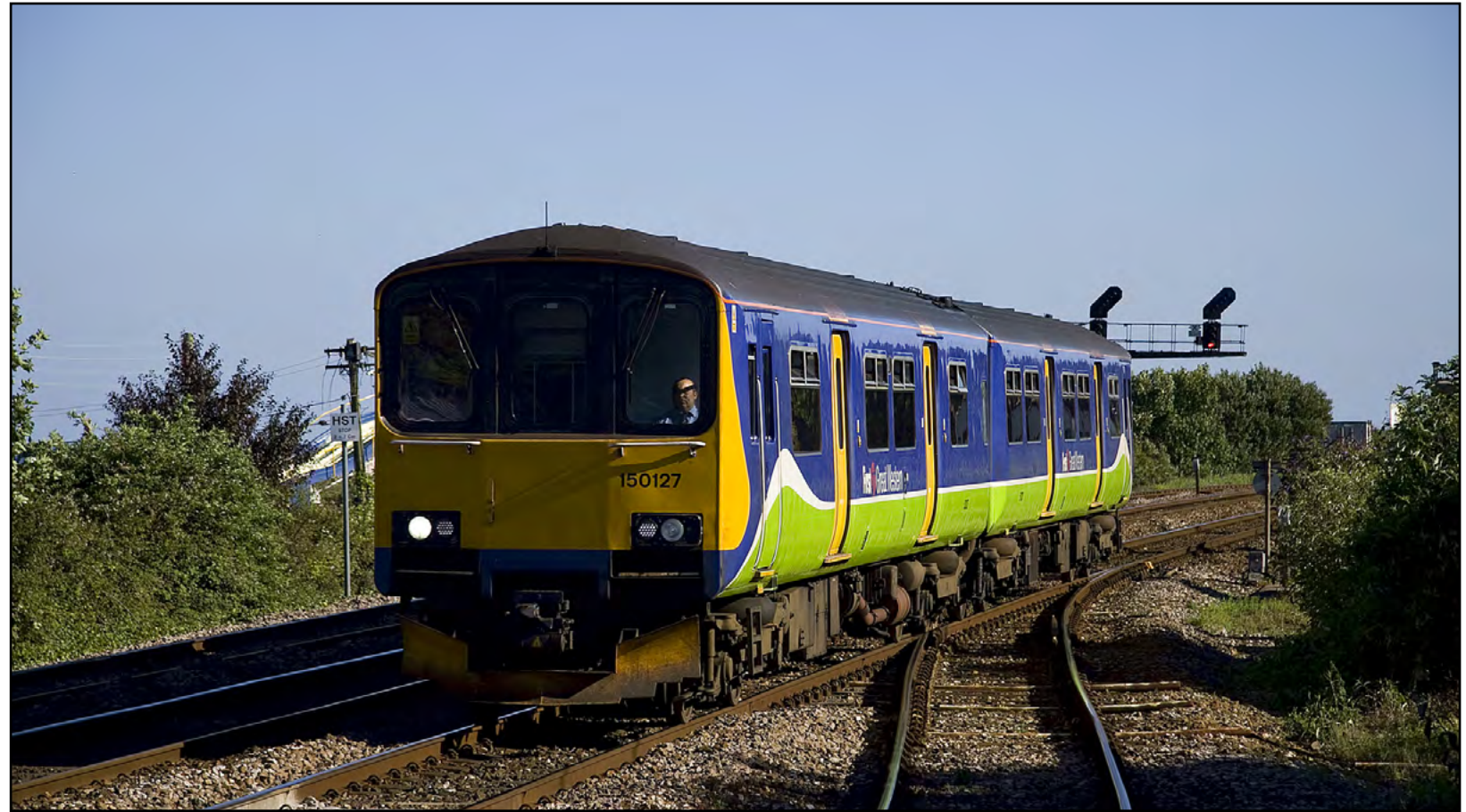
Above: Still carrying the remains of its previous operator, Silverlink, Class 150 127 heads past Dawlish Warren on July 25th with a service for Exmouth. Below: With the disused signal box at Dawlish boarded up in the background, FGW HST lead by 43177 speeds through Dawlish on July 29th heading for Penzance.