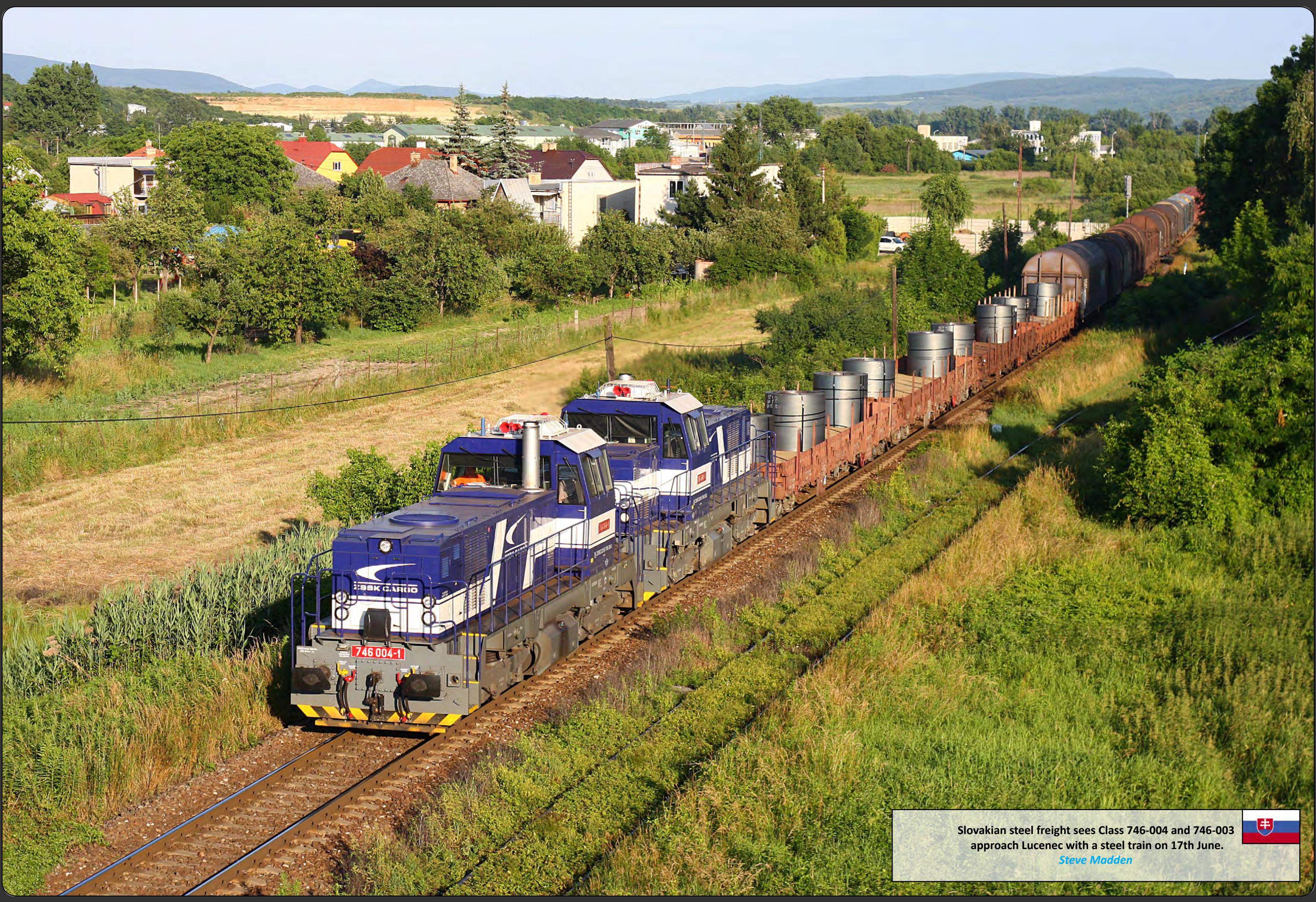
Slovakian steel freight sees Class 746-004 and 746-003 approach Lucenec with a steel train on 17th June.