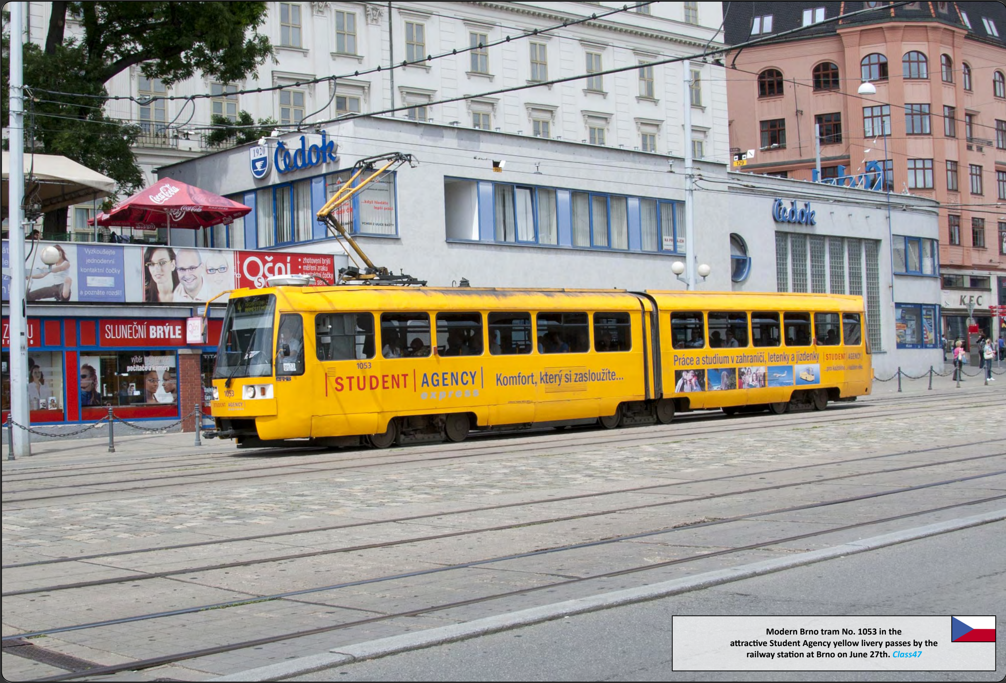
Modern Brno tram No. 1053 in the attractive Student Agency yellow livery passes by the railway station at Brno on June 27th. Class47