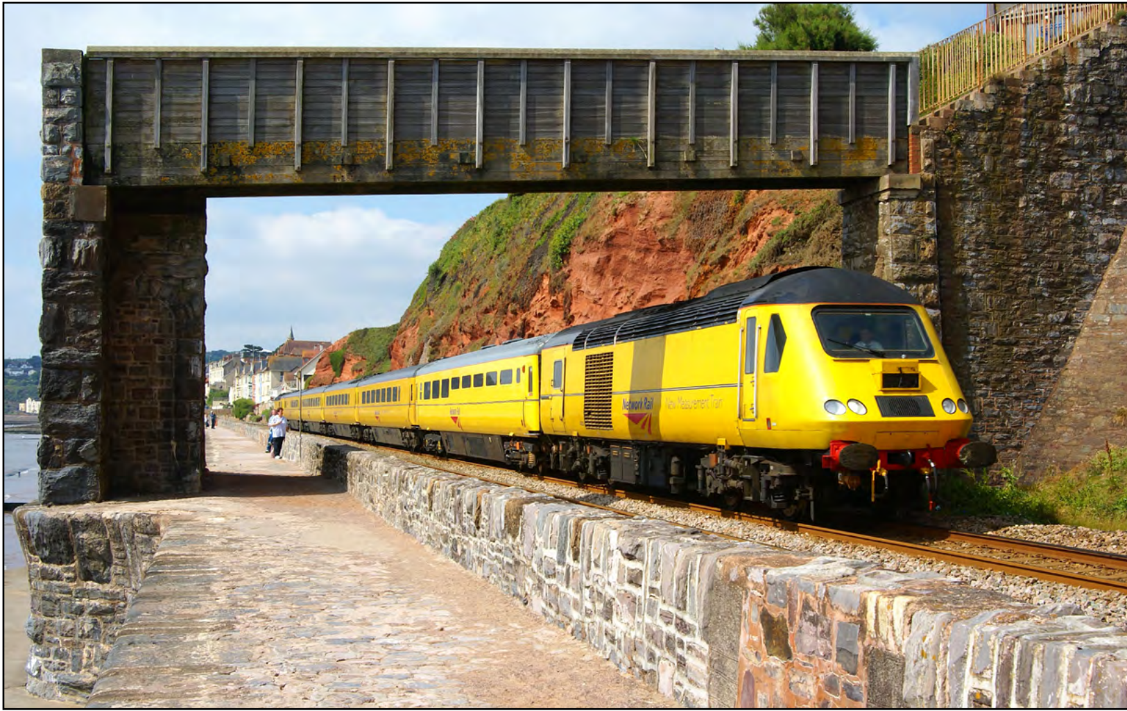
Above: The contrasting yellow livery of Network Rail's Measurement Train, clearly stands out against the backdrop of red rock at Rockstone Bridge, as 43013 and 43014 pass by on July 22nd. Below: On July 25th, CrossCountry 43378 and 43357 speed through Dawlish Warren with a Penzance - Glasgow service.