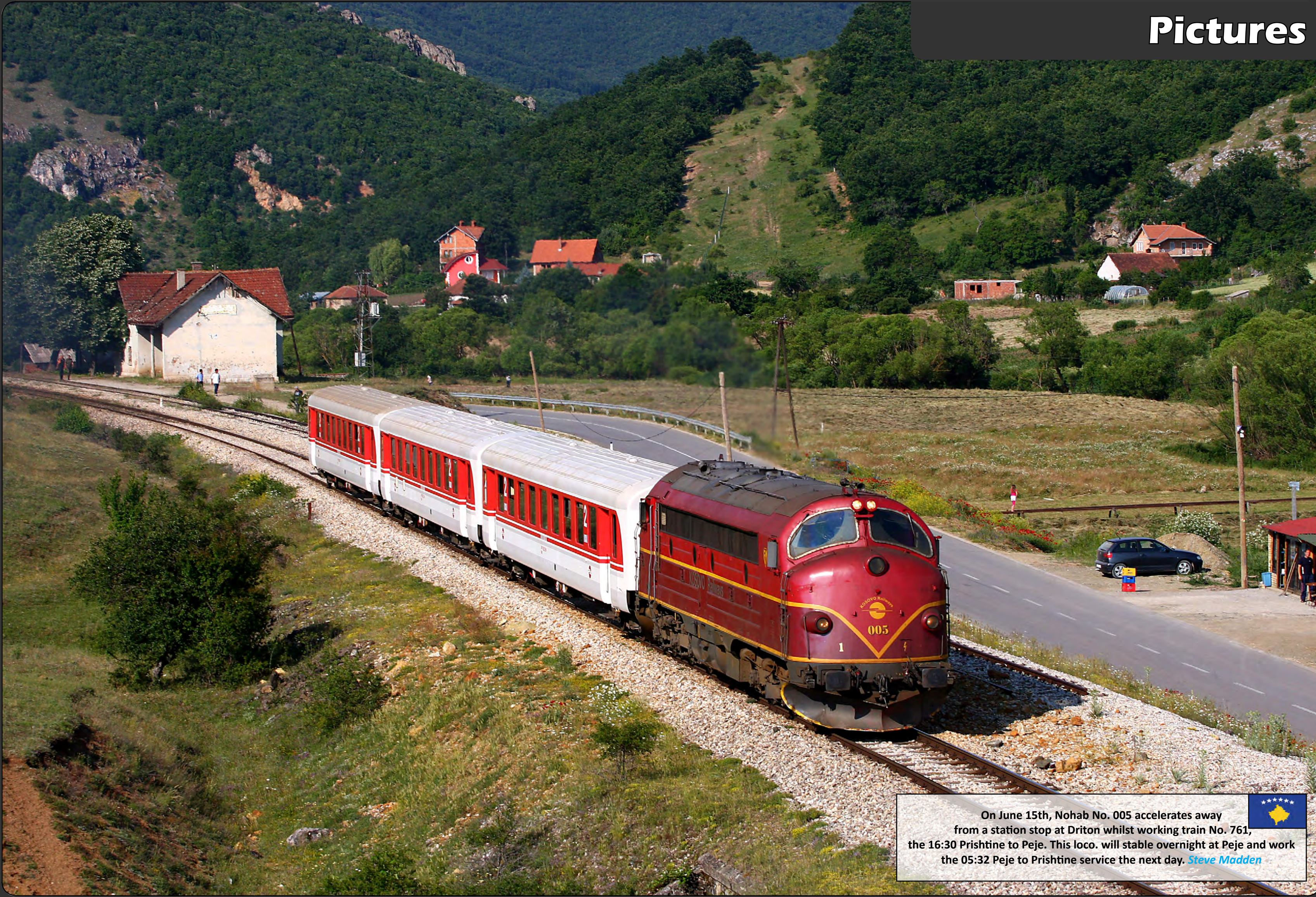
On June 15th, Nohab No. 005 accelerates away from a station stop at Driton whilst working train No. 761, the 16:30 Prishtine to Peje. This loco. will stable overnight at Peje and work the 05:32 Peje to Prishtine service the next day. Steve Madden