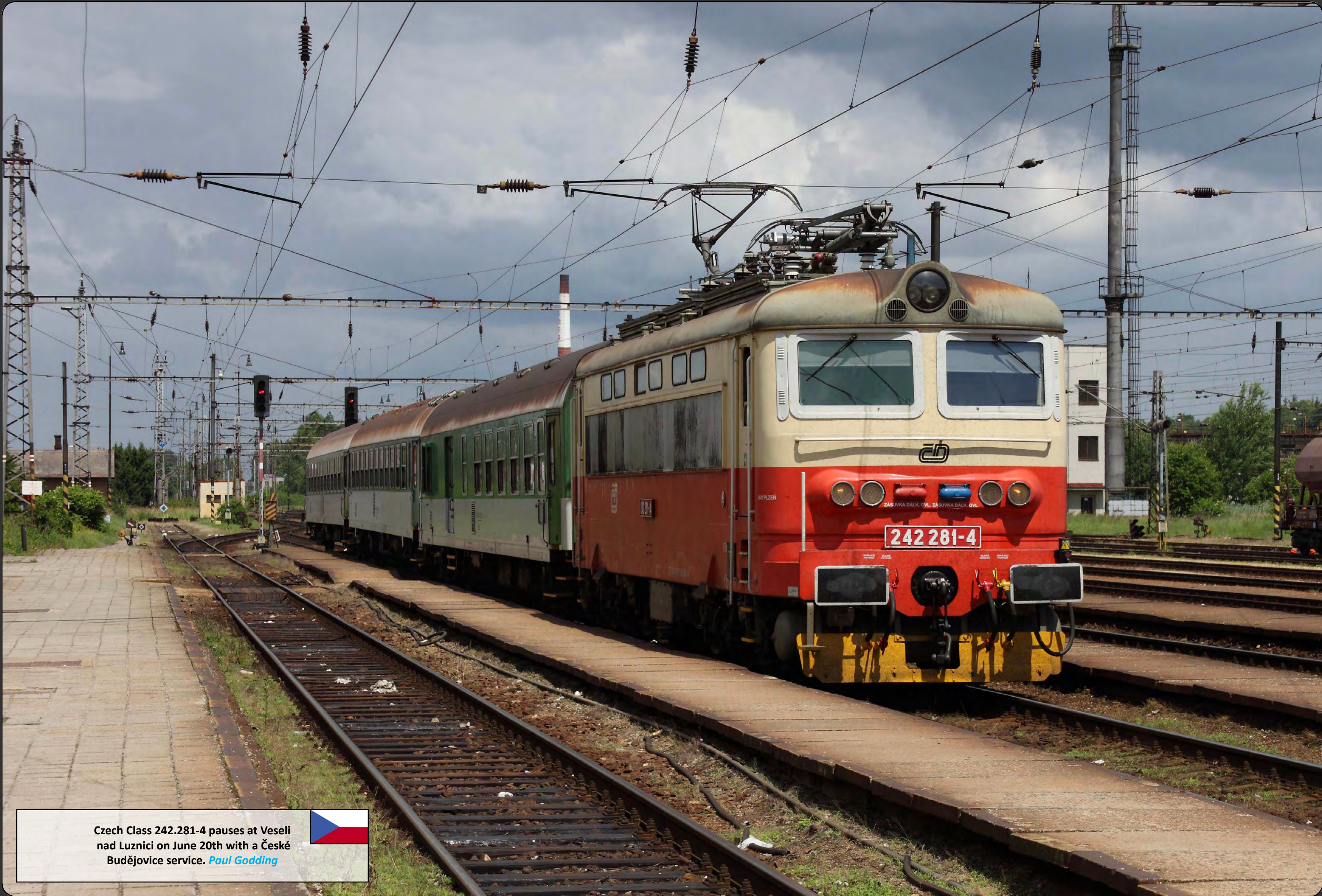
Czech Class 242.281-4 pauses at Veseli nad Lužnicí on June 20th with a České Budějovice service.