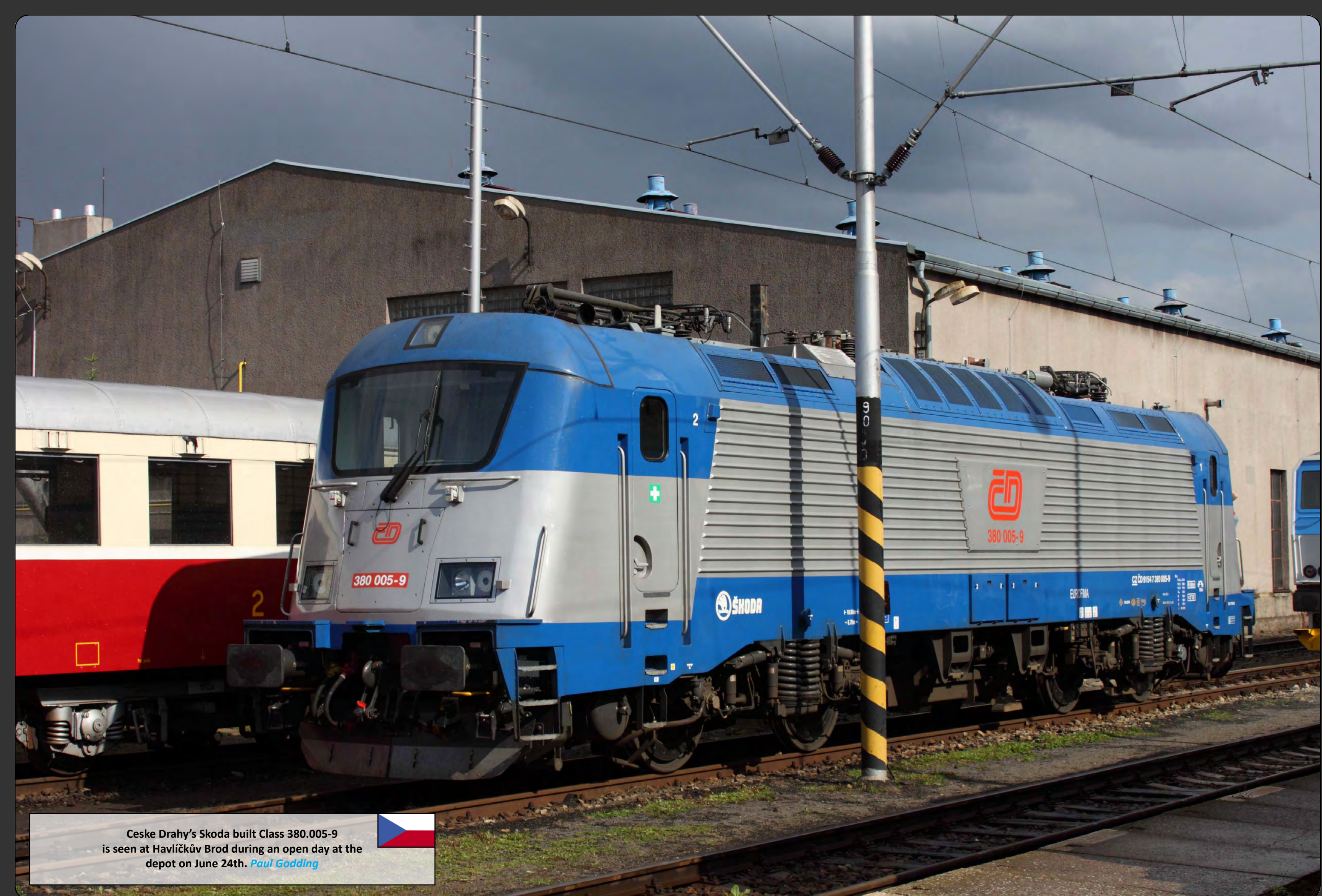
Ceske Drahy's Skoda built Class 380.005-9 is seen at Havlíčkův Brod during an open day at the depot on June 24th.