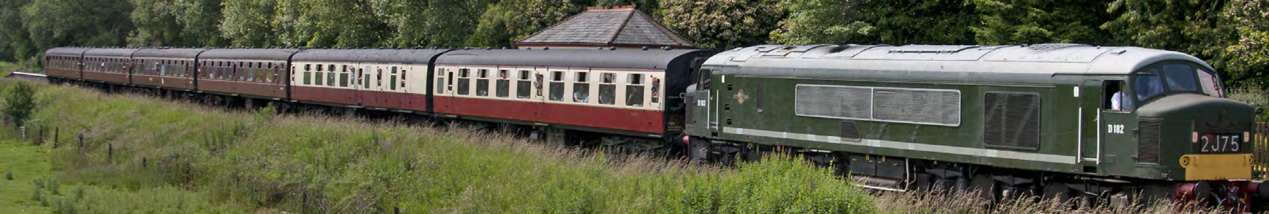
Class 46 No. D182 pauses at Irwell Vale whilst working a Heywood - Rawtenstall service on July 2nd. Class47