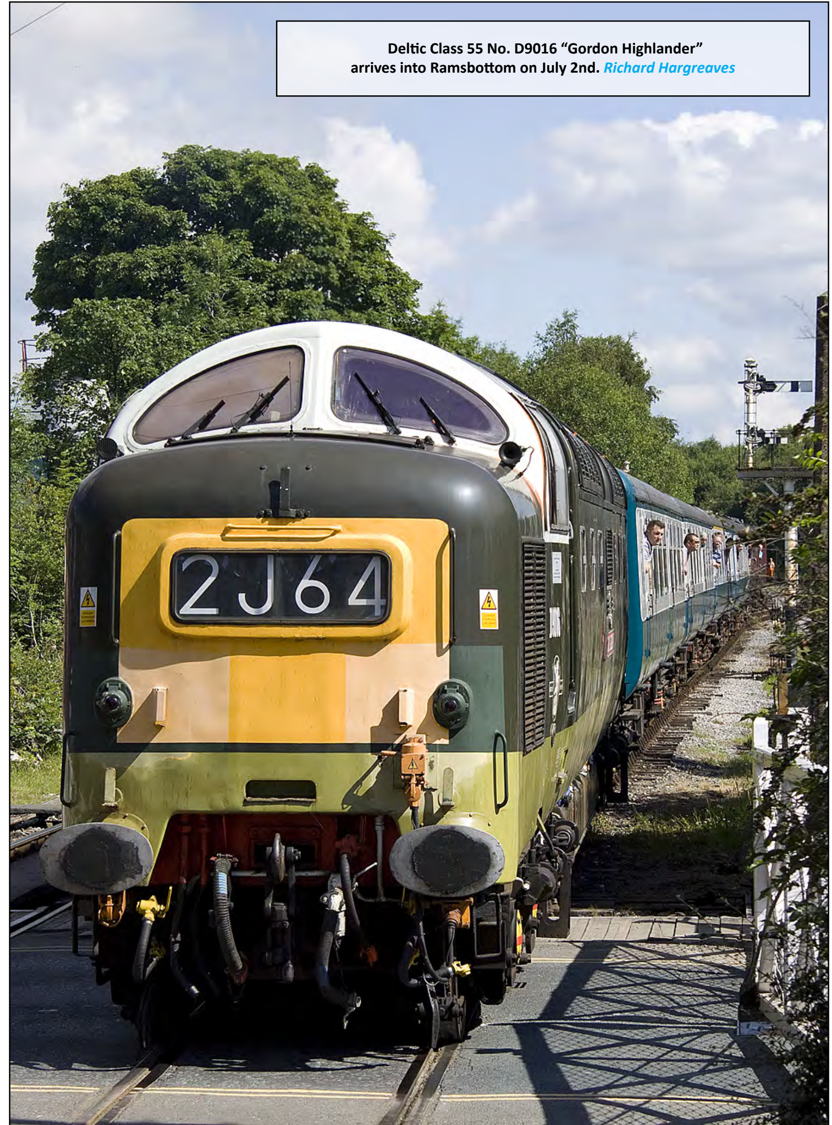
Deltic Class 55 No. D9016 "Gordon Highlander" arrives into Ramsbottom on July 2nd.