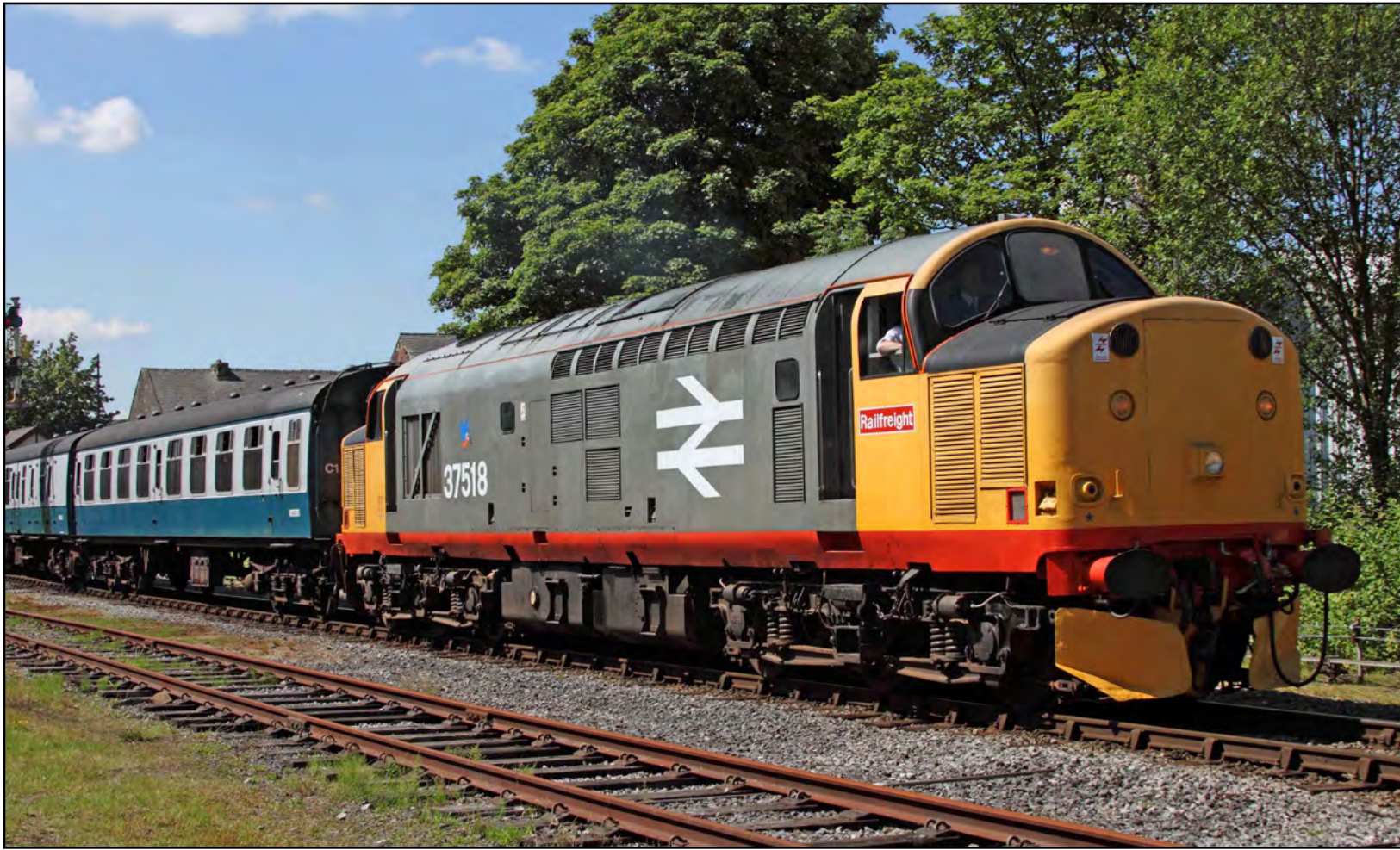
Above: Class 37 518 in BR Railfreight livery departs Ramsbottom. Below: A look at superbly authentic MK1 Corridor Composite No. E16153 at Bury.