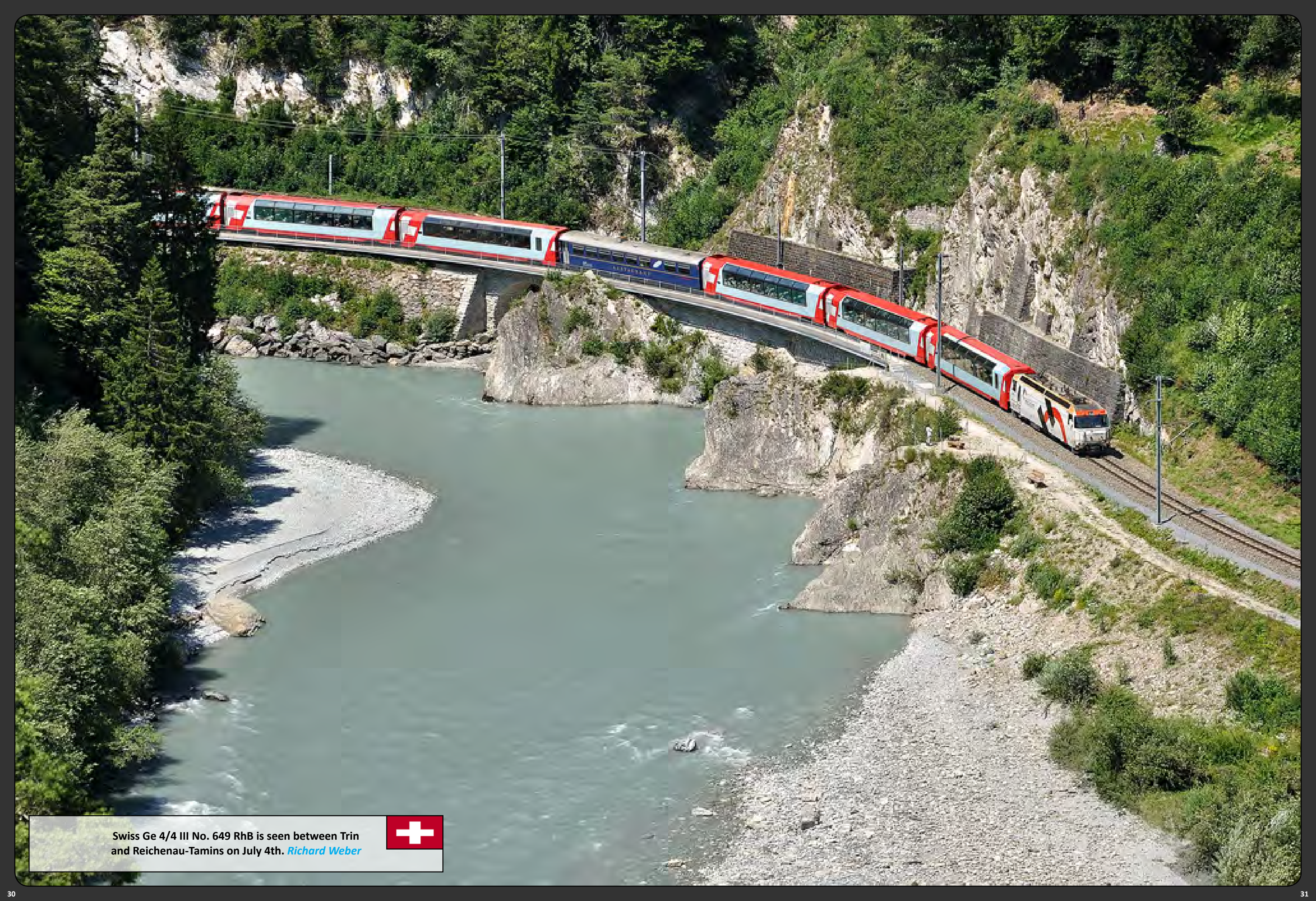
Swiss Ge 4/4 III No. 649 RhB is seen between Trin and Reichenau-Tamins on July 4th.