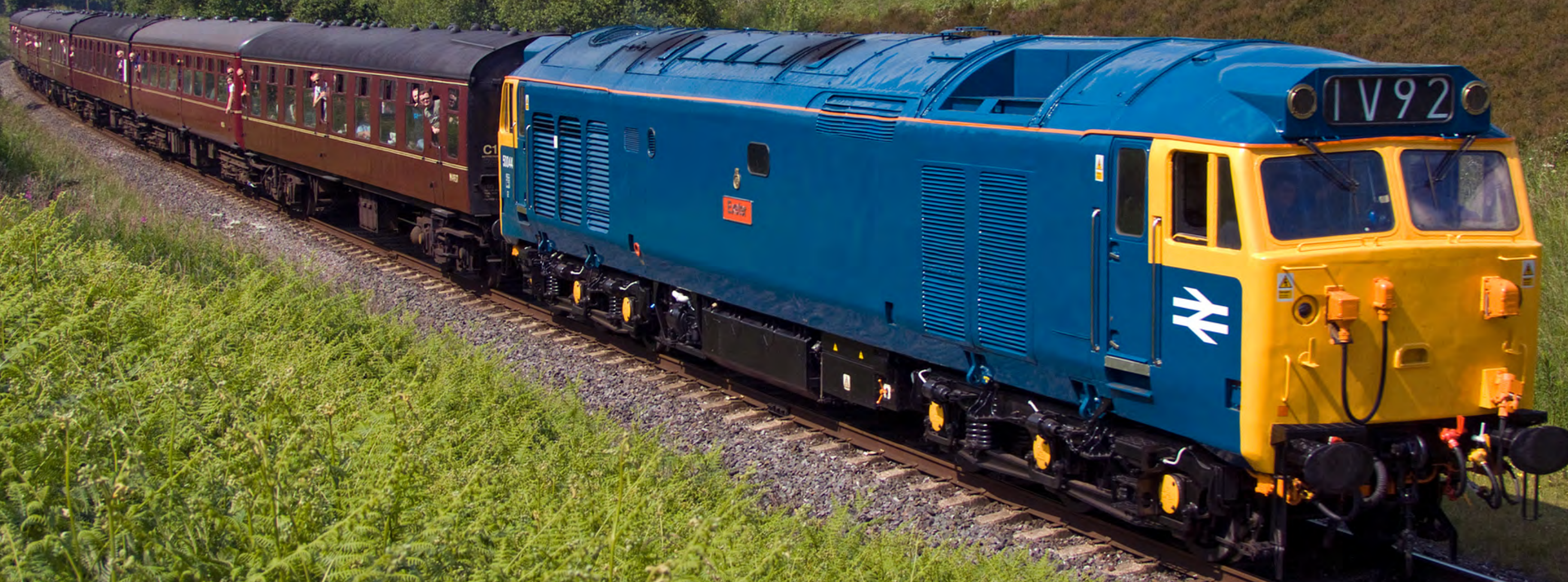
English Electric Class 50 044 is seen working the 2J78 Rawtenstall - Heywood through Burrs on July 2nd.

Every Summer, usually at the beginning of July, the East Lancashire Railway (which runs from Heywood to Rawtenstall via Bolton), holds a large multi day diesel event. There are always several visiting locos enjoying the run through the Lancashire countryside and this event is always well attended by enthusiasts.