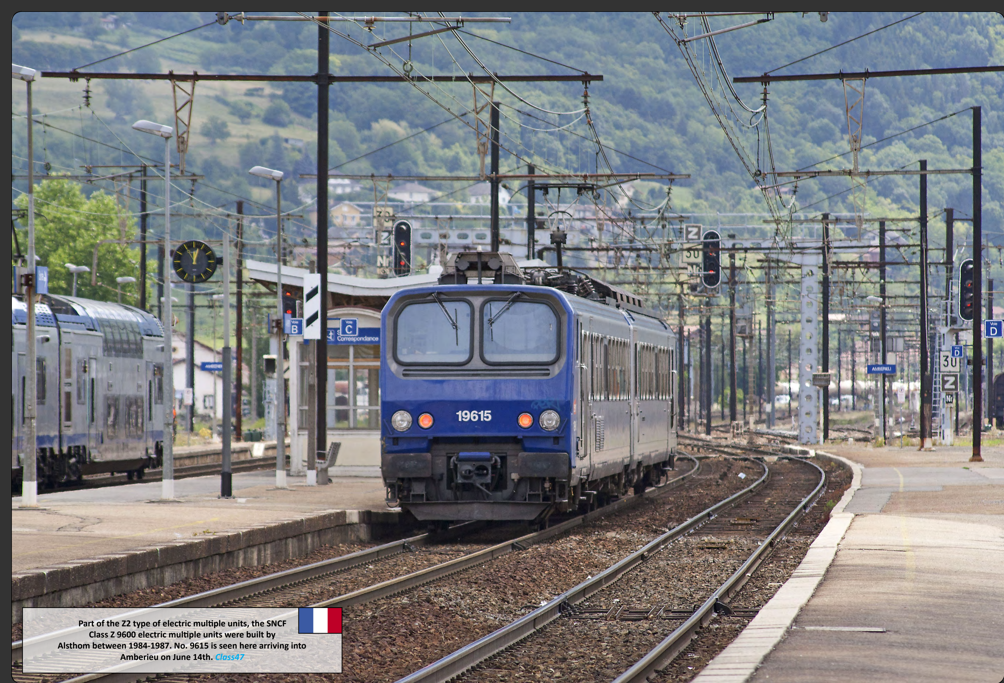
Part of the Z2 type of electric multiple units, the SNCF Class Z 9600 electric multiple units were built by Alstom between 1984-1987. No. 9615 is seen here arriving into Amberieu on June 14th.