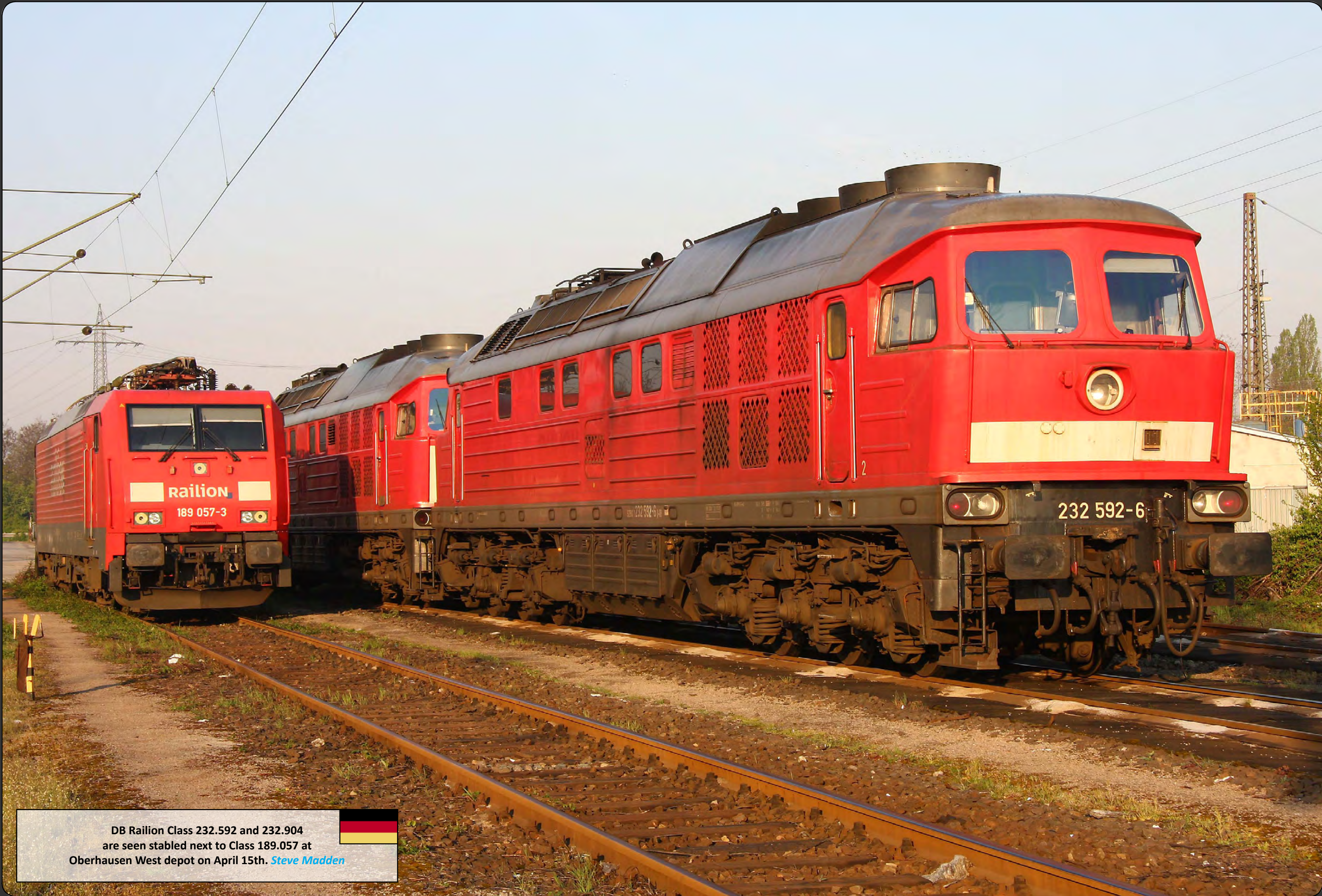
DB Railion Class 232.592 and 232.904 are seen stabled next to Class 189.057 at Oberhausen West depot on April 15th. Steve Madden