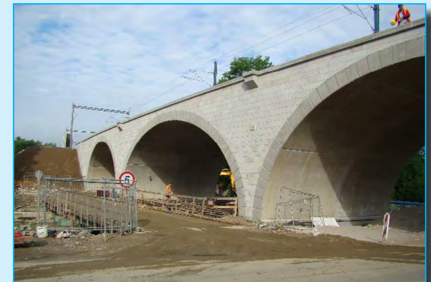
Photo: Rokycany Bridge across Padrský brook.

This construction also requires coordination with the staff that ensure rail operation since most work is carried out during continuous track possessions simultaneously with the operation on a sidetrack. Detours on adjacent roads are necessary.