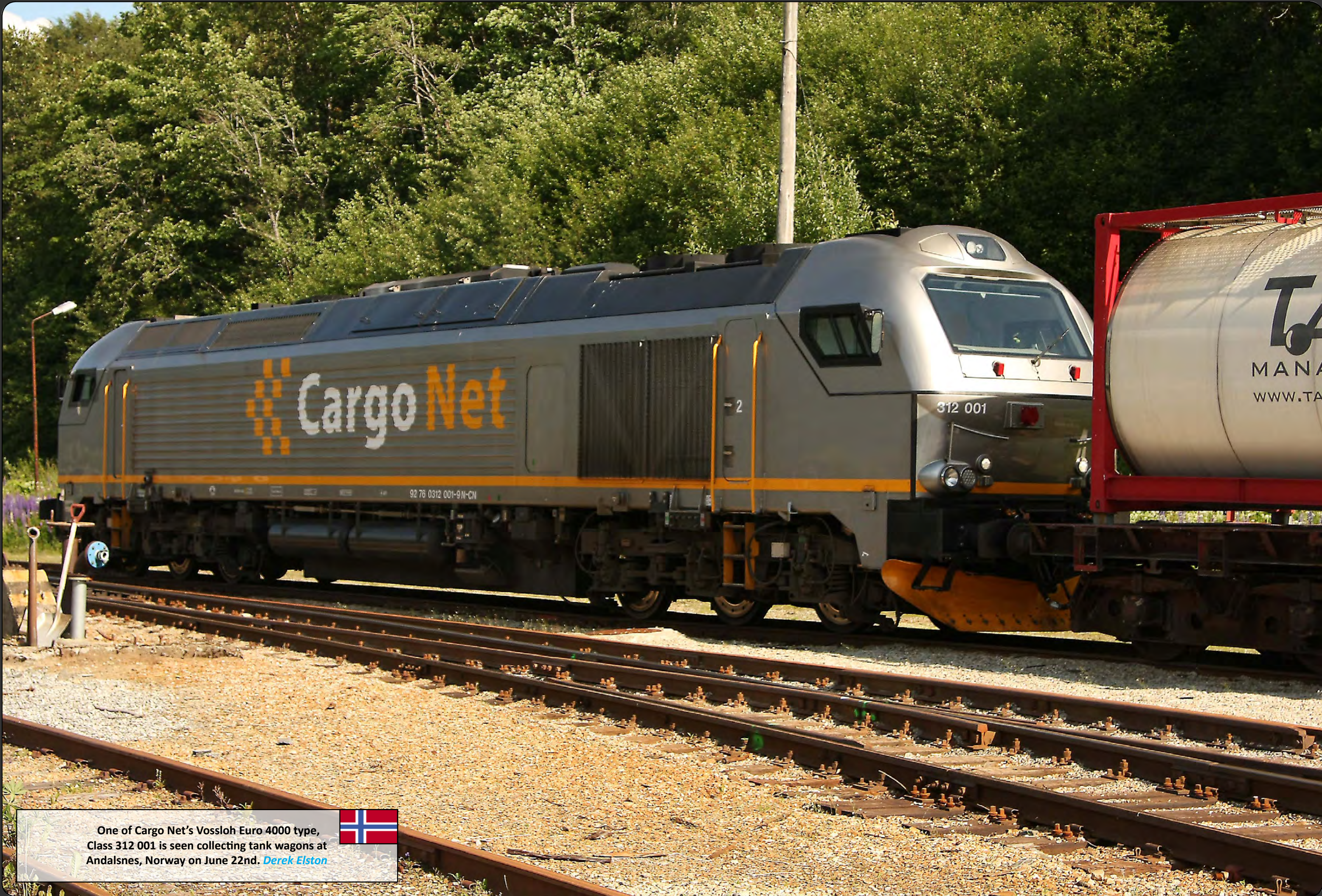
One of Cargo Net's Vossloh Euro 4000 type, Class 312 001 is seen collecting tank wagons at Andalsnes, Norway on June 22nd. Derek Elston