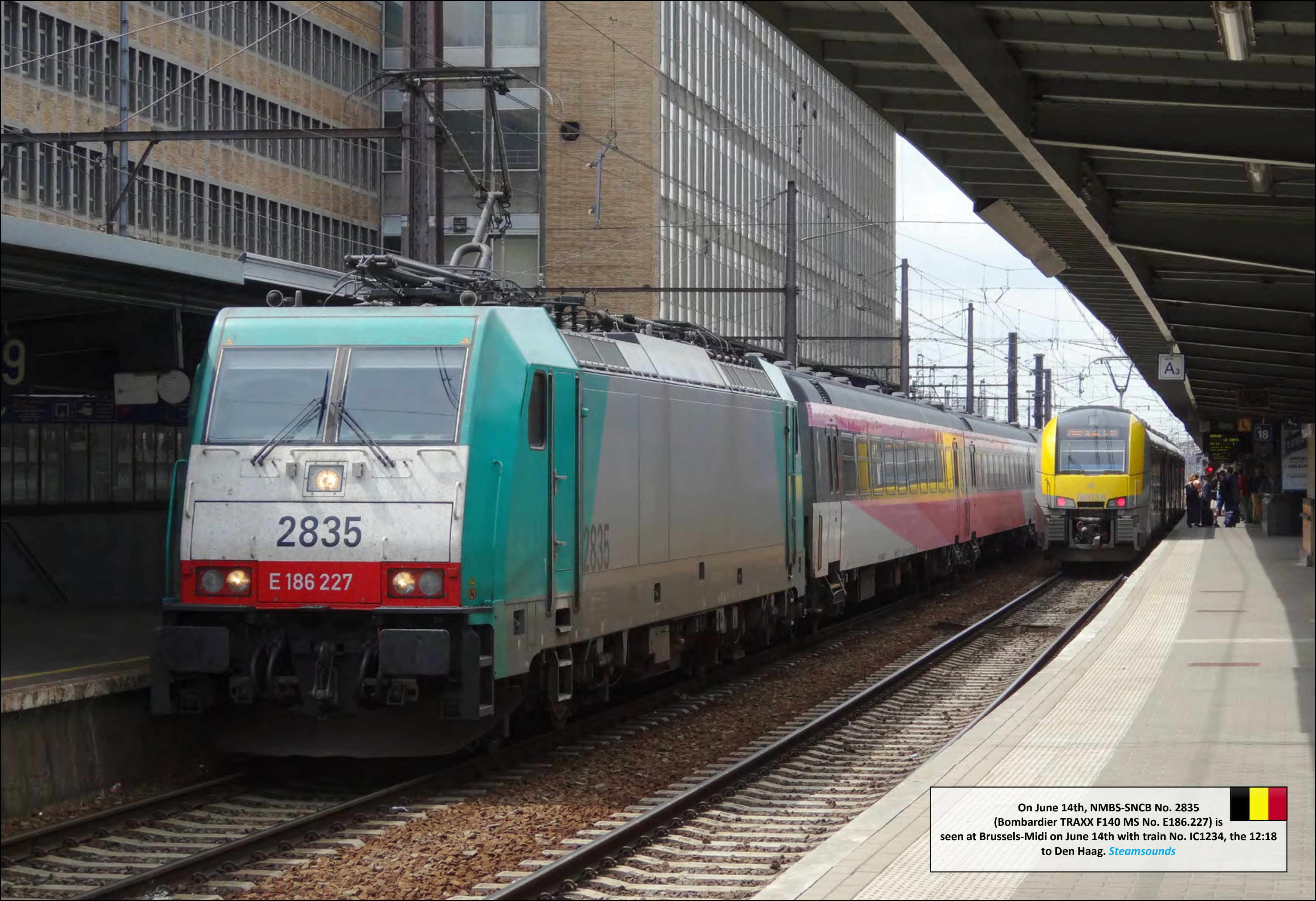
On June 14th, NMBS-SNCB No. 2835 (Bombardier TRAXX F140 MS No. E186.227) is seen at Brussels-Midi on June 14th with train No. IC1234, the 12:18 to Den Haag. Stearnsounds