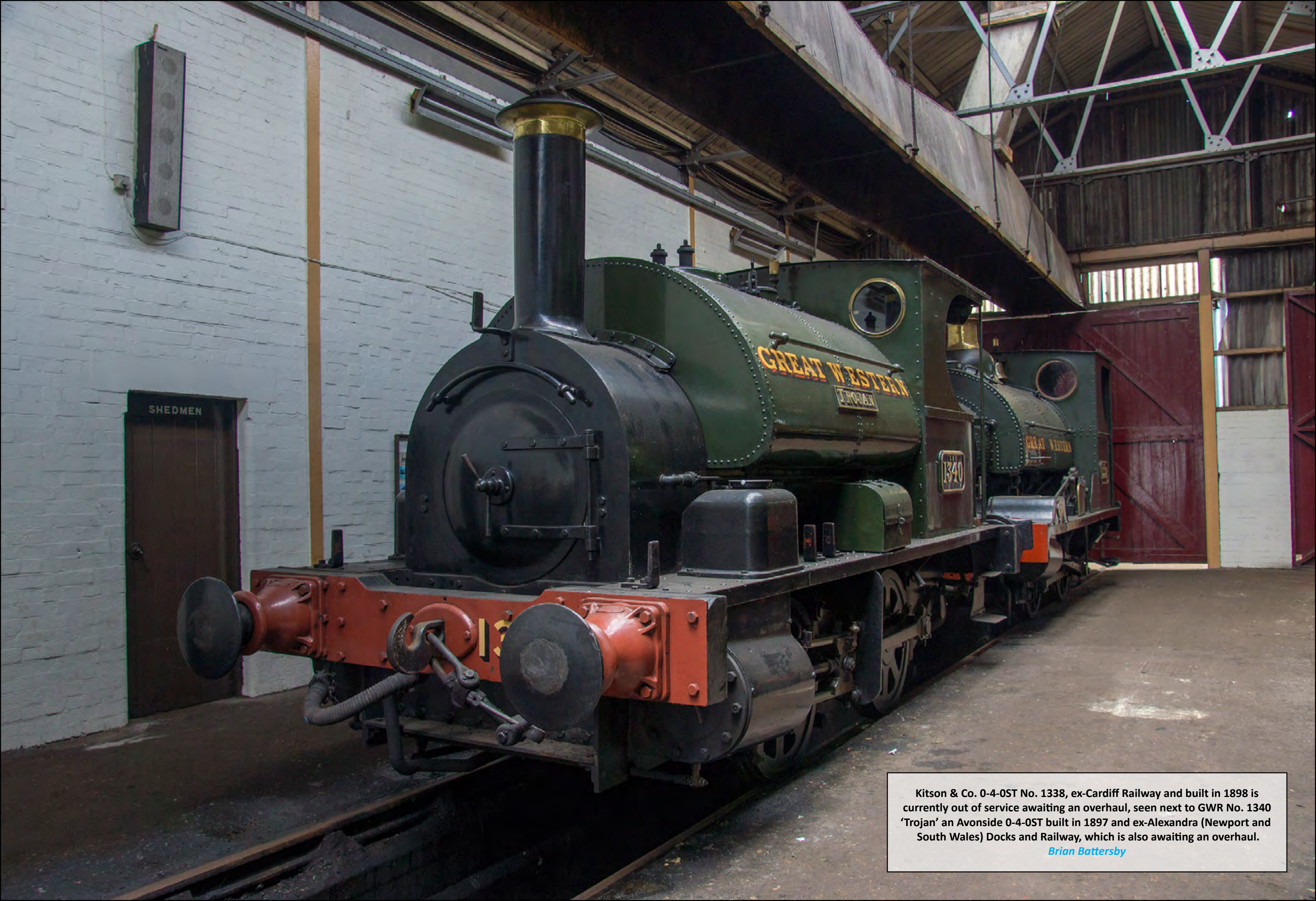
Kitson & Co. 0-4-0ST No. 1338, ex-Cardiff Railway and built in 1898 is currently out of service awaiting an overhaul, seen next to GWR No. 1340 'Trojan' an Avonside 0-4-0ST built in 1897 and ex-Alexandra (Newport and South Wales) Docks and Railway, which is also awaiting an overhaul. Brian Battersby