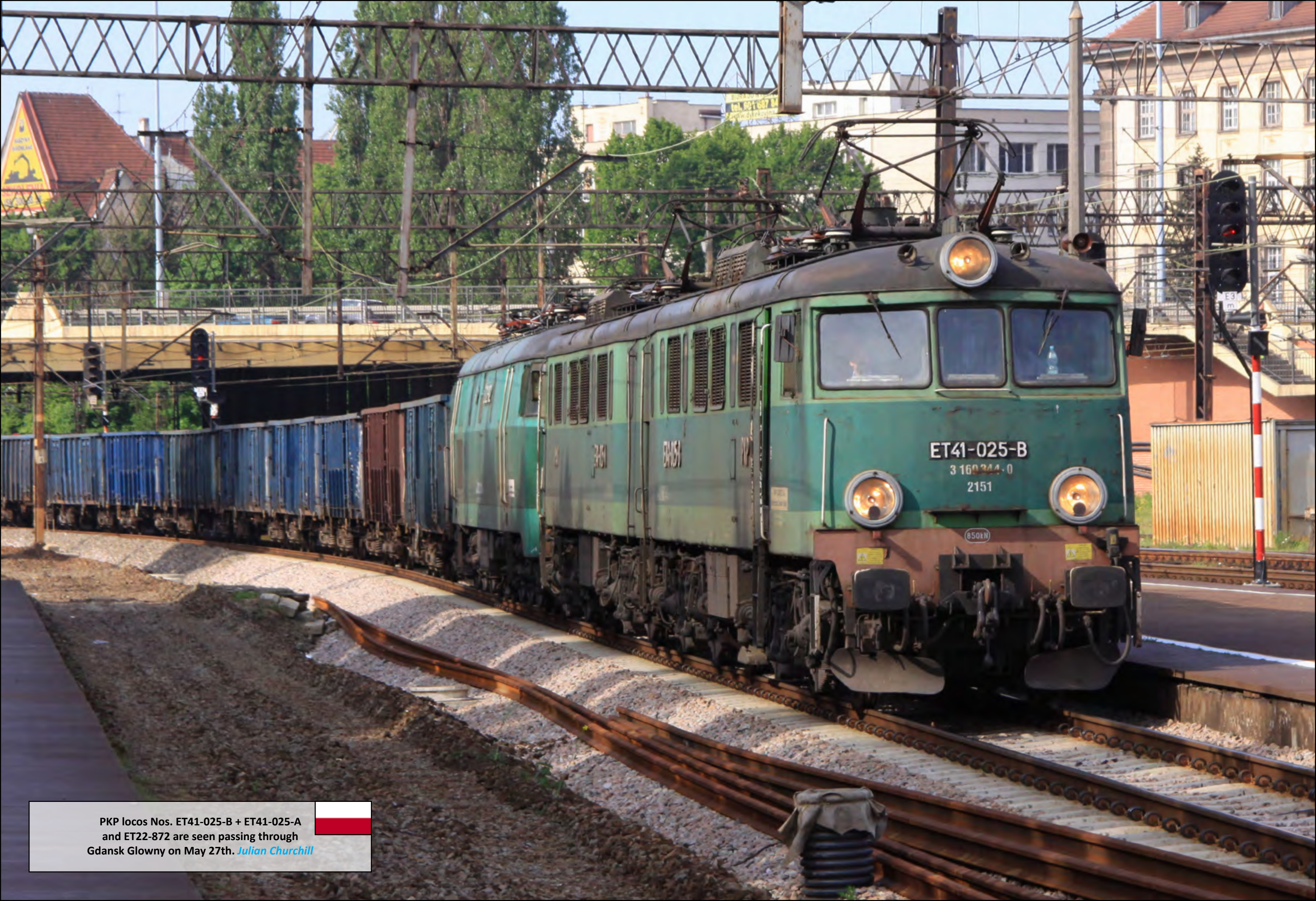
PKP locos Nos. ET41-025-B + ET41-025-A and ET22-872 are seen passing through Gdansk Glowny on May 27th.