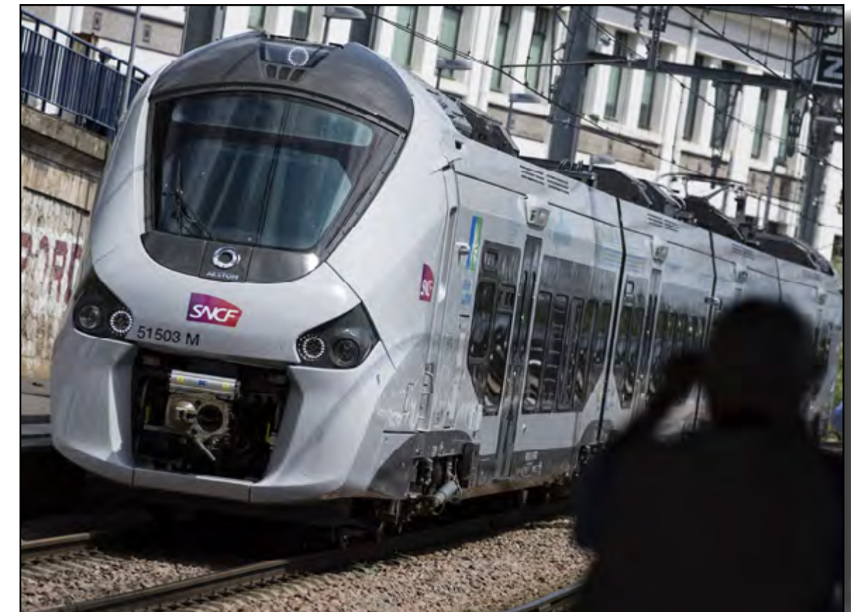
Photo: The first Régiolis trainset arriving at the Bordeaux Saint-Jean station.

The manufacturing of Régiolis trains generates more than 4,000 jobs in France at Alstom and its suppliers. 6 out of 10 Alstom facilities in France are taking part in the project: Reichshoffen for the design and the assembly, Ornans (motors), Le Creusot (bogies), Tarbes (traction systems), Villeurbanne (on-board computer systems) and Saint-Ouen (design).