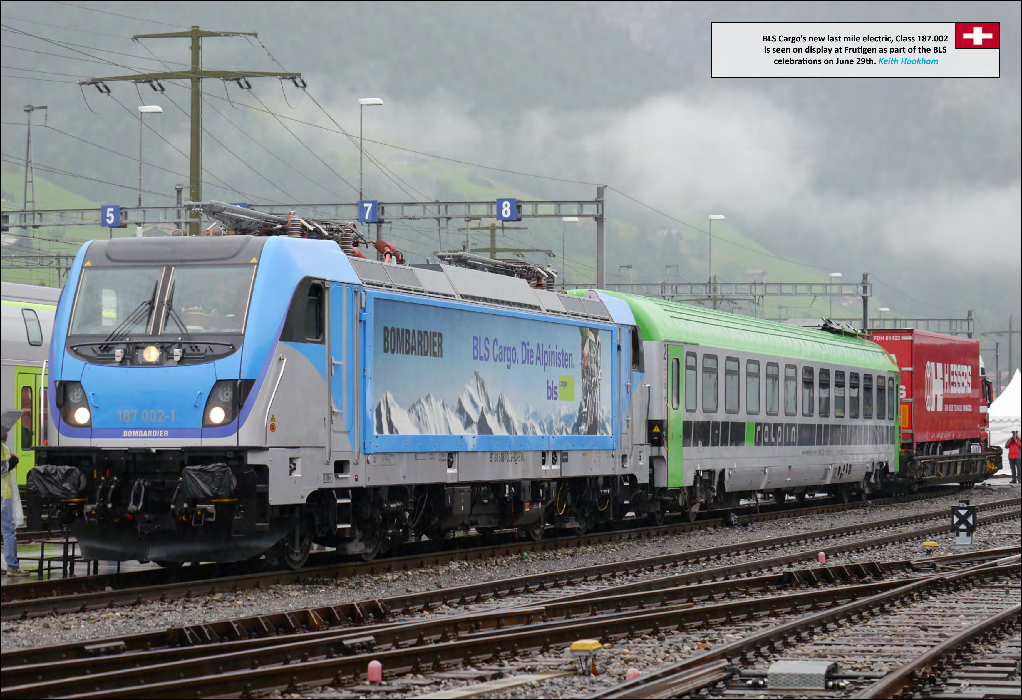
BLS Cargo's new last mile electric, Class 187.002 is seen on display at Frutigen as part of the BLS celebrations on June 29th. Keith Hookham