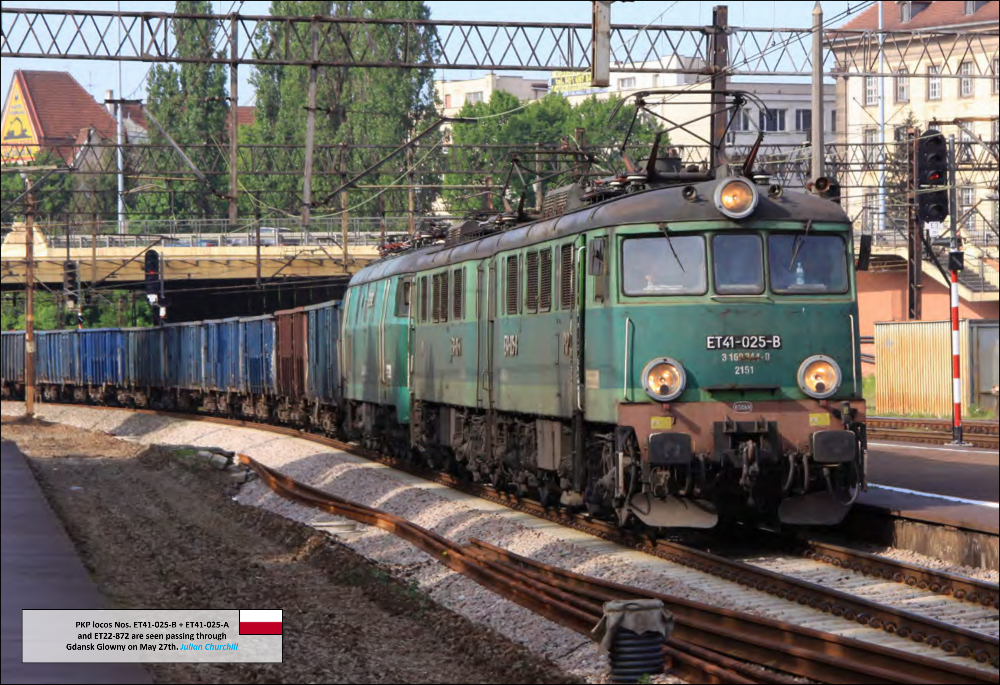
PKP locos Nos. ET41-025-B + ET41-025-A and ET22-872 are seen passing through Gdansk Glowny on May 27th.