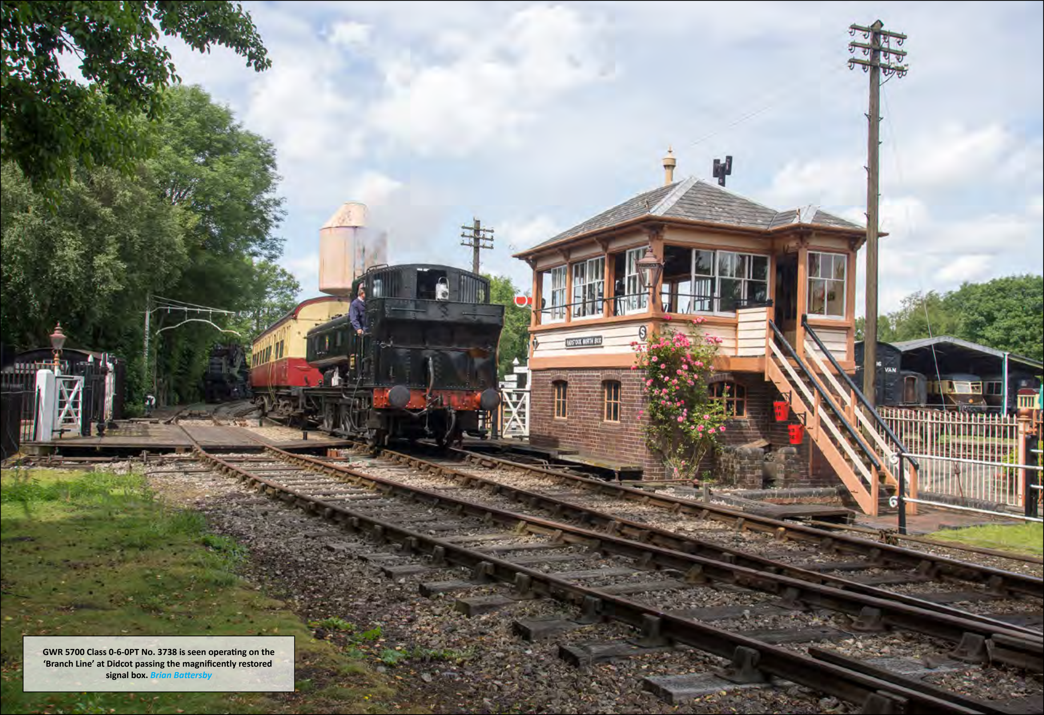
GWR 5700 Class 0-6-0PT No. 3738 is seen operating on the 'Branch Line' at Didcot passing the magnificently restored signal box. Brian Battersby