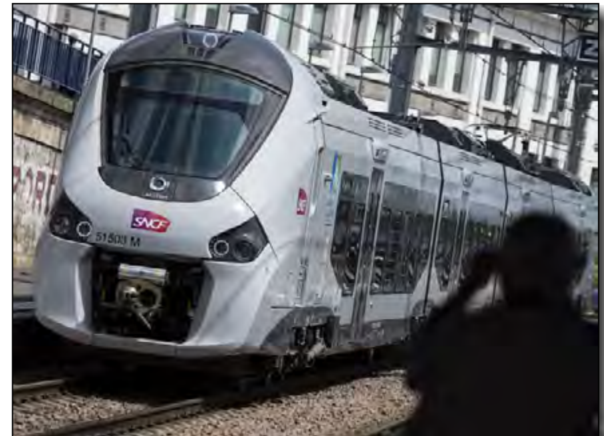
Photo: The first Régiolis trainset arriving at the Bordeaux Saint-Jean station.

The manufacturing of Régiolis trains generates more than 4,000 jobs in France at Alstom and its suppliers. 6 out of 10 Alstom facilities in France are taking part in the project: Reichshoffen for the design and the assembly, Ornans (motors), Le Creusot (bogies), Tarbes (traction systems), Villeurbanne (on-board computer systems) and Saint-Ouen (design).