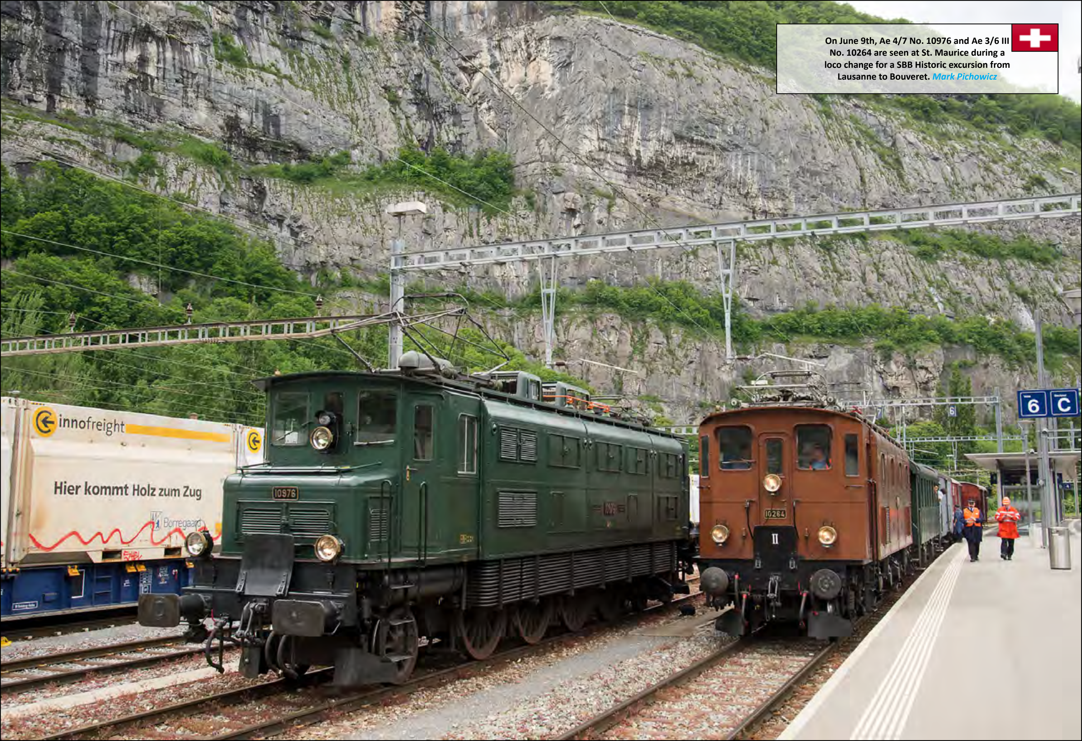
On June 9th, Ae 4/7 No. 10976 and Ae 3/6 III No. 10264 are seen at St. Maurice during a loco change for a SBB Historic excursion from Lausanne to Bouveret. Mark Pichowicz