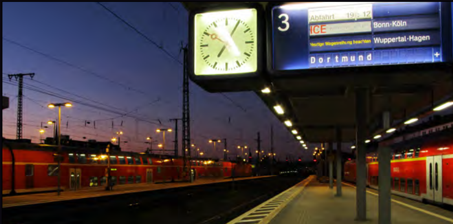
Evening scene at Koblenz Hbf. Steamsounds