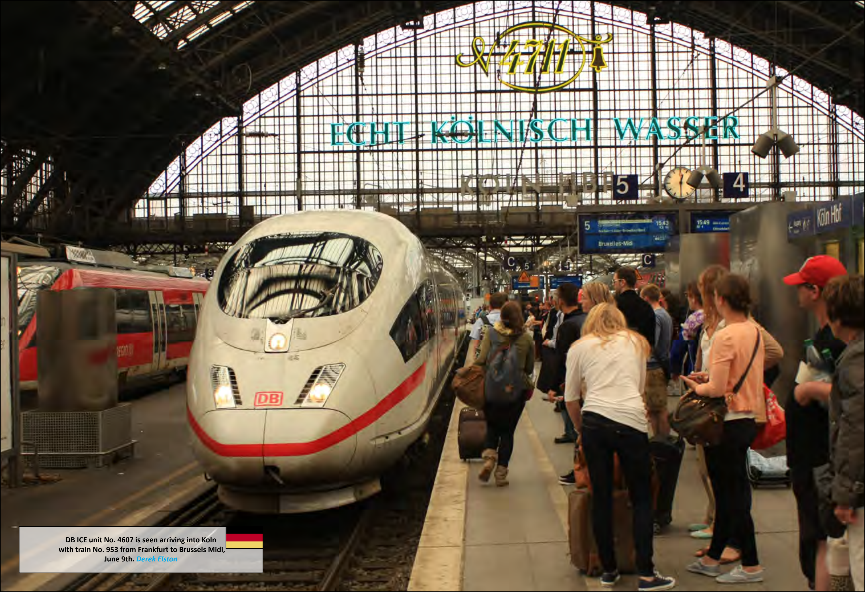
DB ICE unit No. 4607 is seen arriving into Koln with train No. 953 from Frankfurt to Brussels Midi, June 9th. Derek Elston