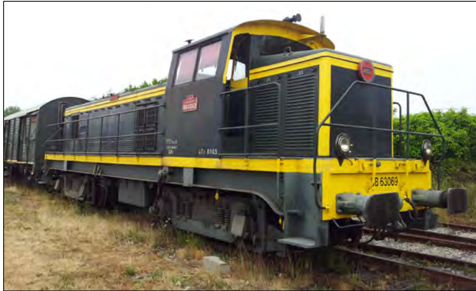
Above: Loco No. BB63069 – Built 1955 by Brissonneau and Lotz in Creil – waits at Carteret on Tuesday July 23rd with the 10:00 "Market Day" service to Portbail. The service provides local transport to the street market and allows 105 minutes at the destination. The rolling stock used dates from the 1930s.

The 'Train Touristique du Cotentin' is a heritage line which runs between Carteret and Portbail (French Normandy) on part of the former SNCF line from Carteret to Coutances. The line closed to passengers in the 1970s but part of it re-opened in 1990 from Carteret to Portail. There was a few years when a small portion had been run at the southern end of the line but had now been abandoned. Generally the trains run Sundays, Tuesdays and Thursdays during July and August.