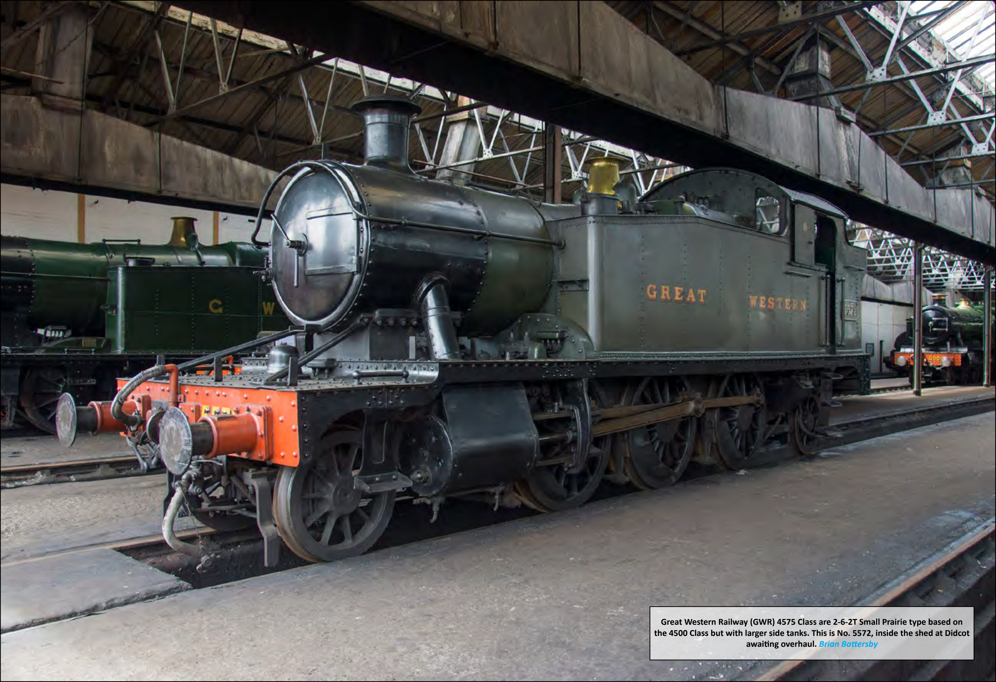
Great Western Railway (GWR) 4575 Class are 2-6-2T Small Prairie type based on the 4500 Class but with larger side tanks. This is No. 5572, inside the shed at Didcot awaiting overhaul. Brian Battersby