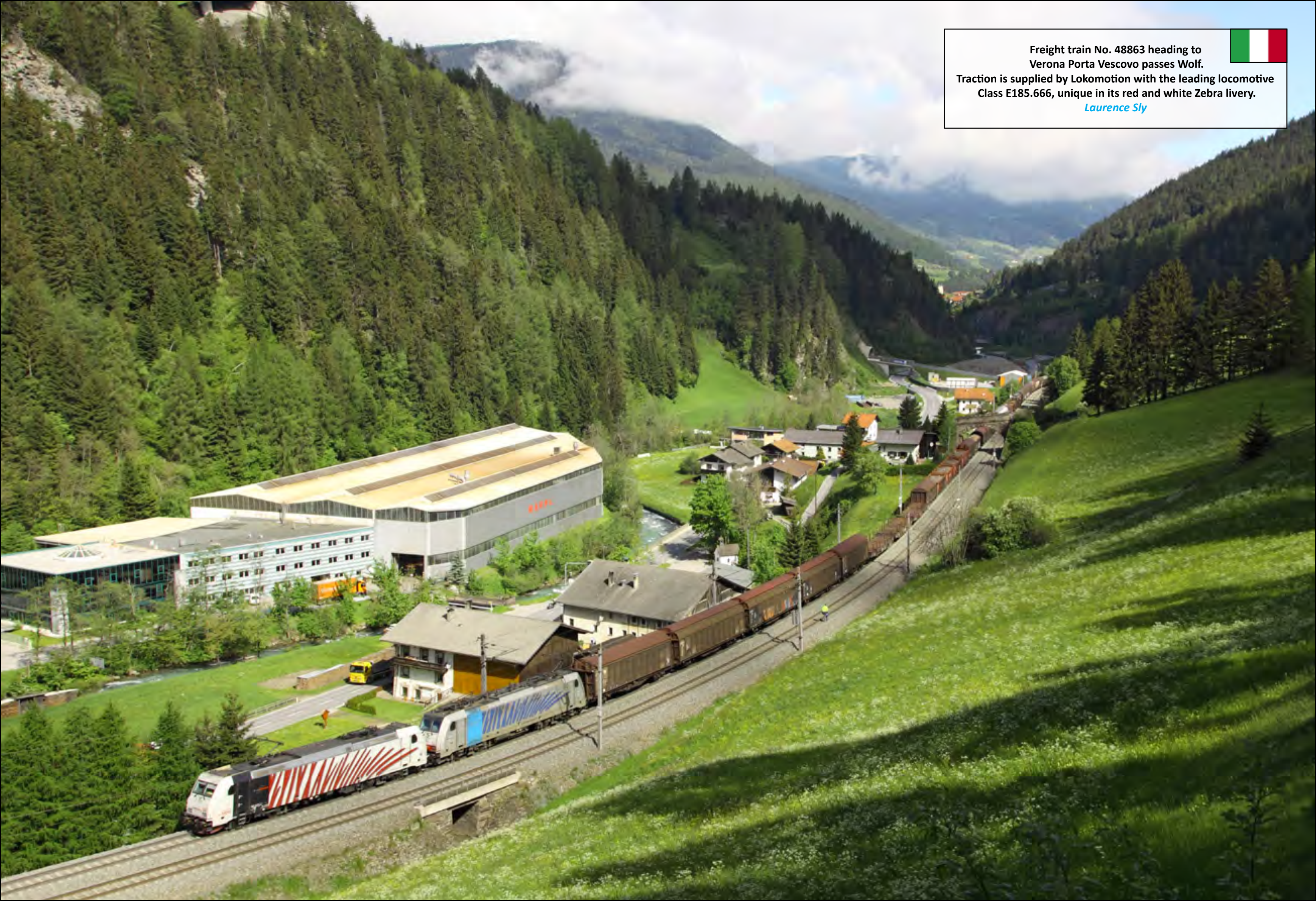
Freight train No. 48863 heading to Verona Porta Vescovo passes Wolf. Traction is supplied by Lokomotion with the leading locomotive Class E185.666, unique in its red and white Zebra livery. Laurence Sly