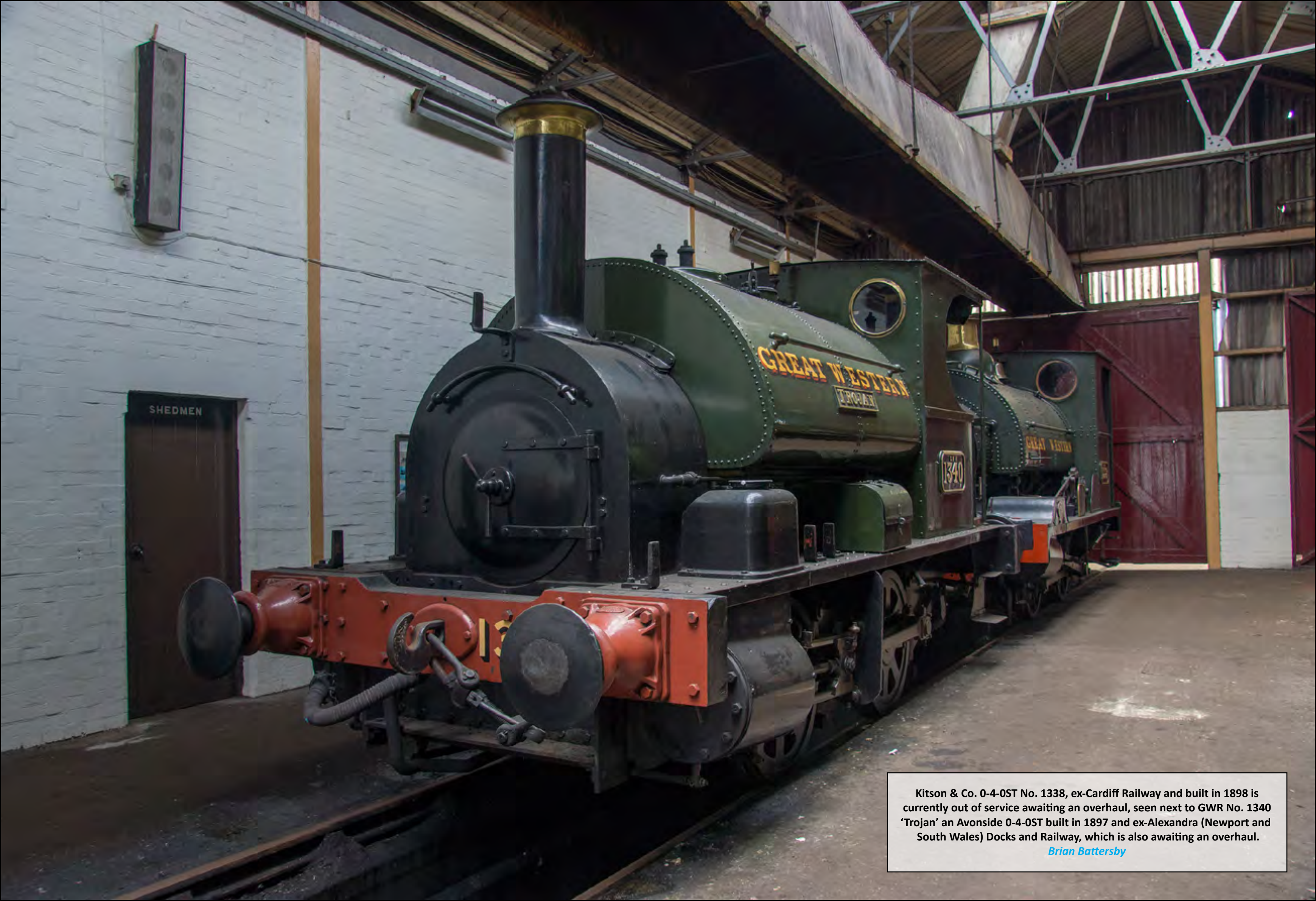
Kitson & Co. 0-4-0ST No. 1338, ex-Cardiff Railway and built in 1898 is currently out of service awaiting an overhaul, seen next to GWR No. 1340 'Trojan' an Avonside 0-4-0ST built in 1897 and ex-Alexandra (Newport and South Wales) Docks and Railway, which is also awaiting an overhaul. Brian Battersby