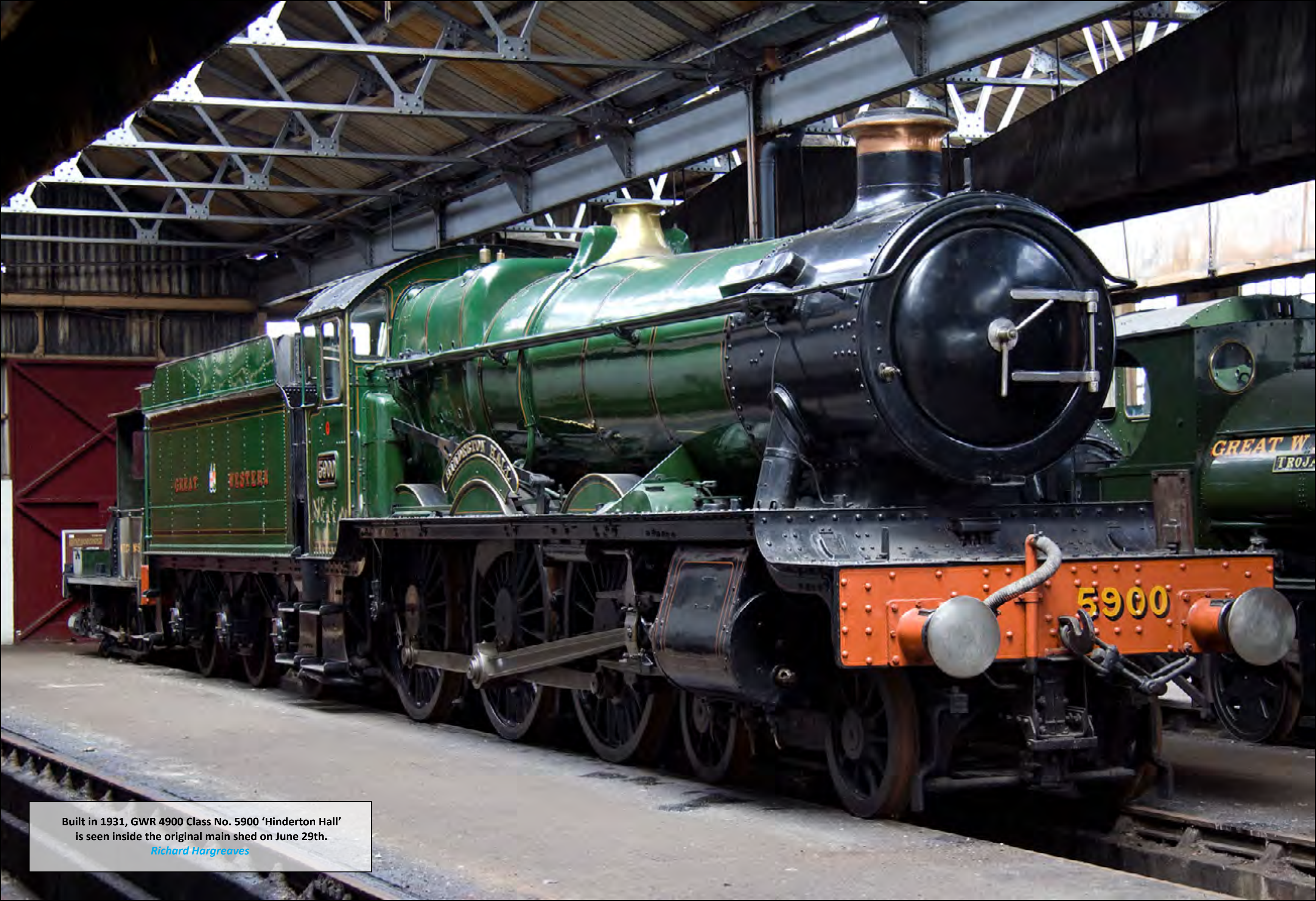
Built in 1931, GWR 4900 Class No. 5900 'Hinderton Hall' is seen inside the original main shed on June 29th.