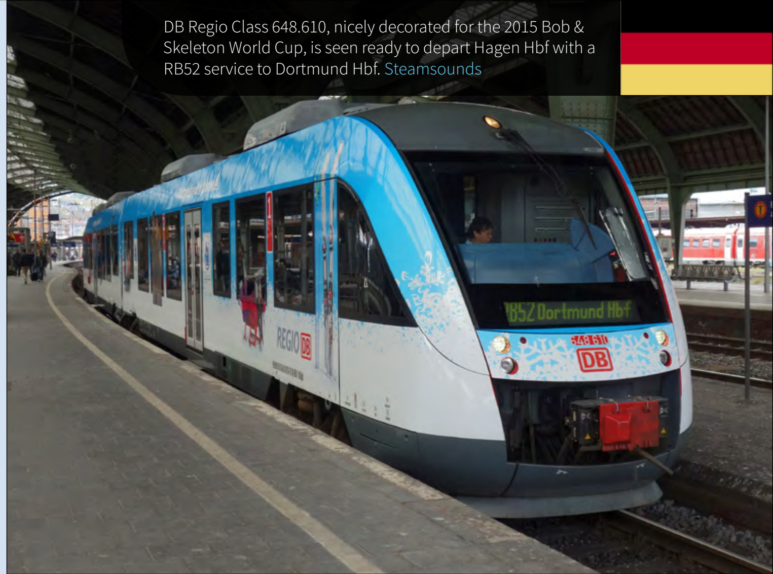
DB Regio Class 648.610, nicely decorated for the 2015 Bob & Skeleton World Cup, is seen ready to depart Hagen Hbf with a RB52 service to Dortmund Hbf.