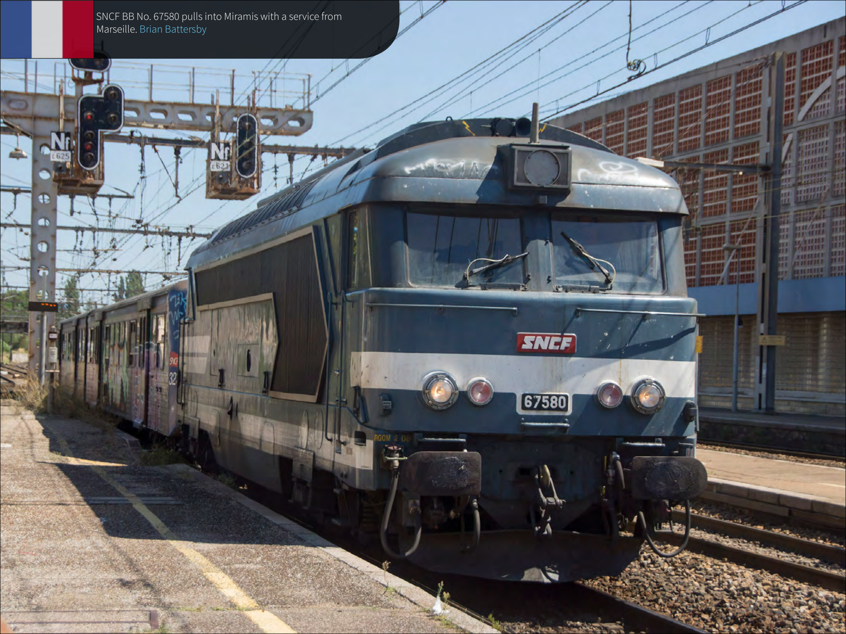
SNCF BB No. 67580 pulls into Miramis with a service from Marseille.