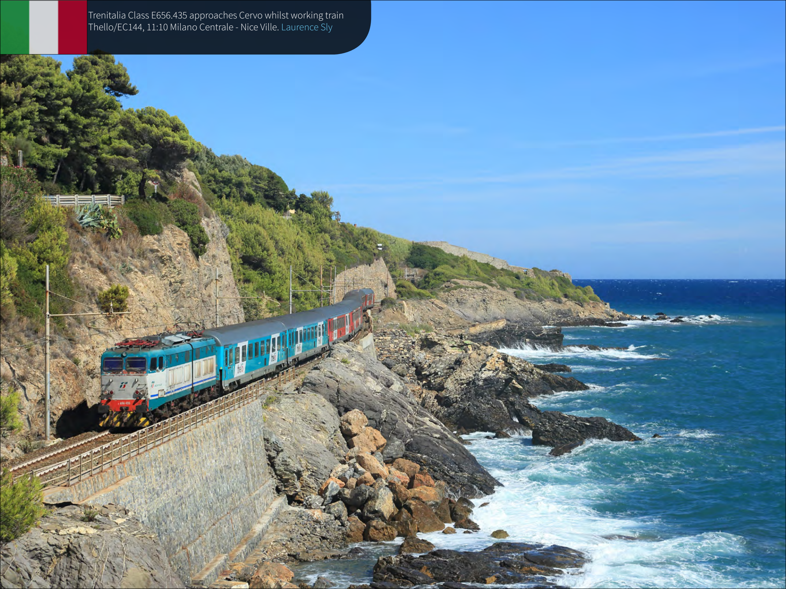
Trenitalia Class E656.435 approaches Cervo whilst working train Thello/EC144, 11:10 Milano Centrale - Nice Ville. Laurence Sly