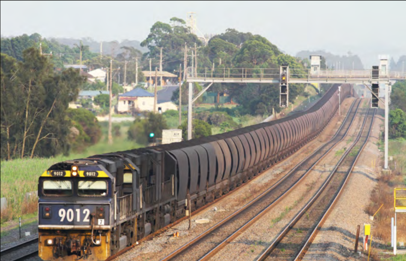
Pacific National No. 9012 leads a loaded coal train through Tarro, heading into the coal handling plants in Newcastle on November 19th. Anton Kendall