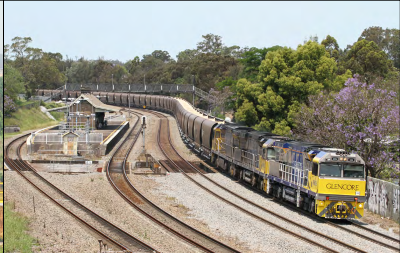
Glencore's GE Transportation's C44aci design Nos. XRN026, XRN023 and XRN019 pass through East Maitland station on November 19th.