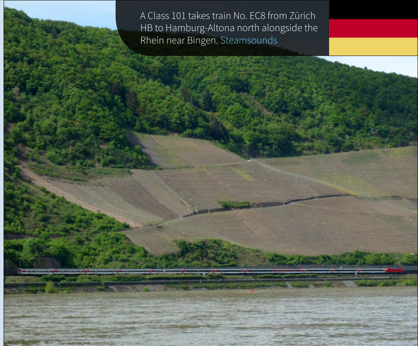
A Class 101 takes train No. EC8 from Zürich HB to Hamburg-Altona north alongside the Rhein near Bingen.

The project, which will take two-and-a-half years to be completed, will allow the operator to manage the circulation of trains safely and in accordance with the latest regulations governing computerised interlocking systems. Passengers will not only benefit from the greater safety, but also from the greater punctuality of the trains. The project will be managed by Alstom's Italian sites: the centre of excellence in Bologna and the R&D centre in Bari, which will collaborate with Charleroi site in Belgium.