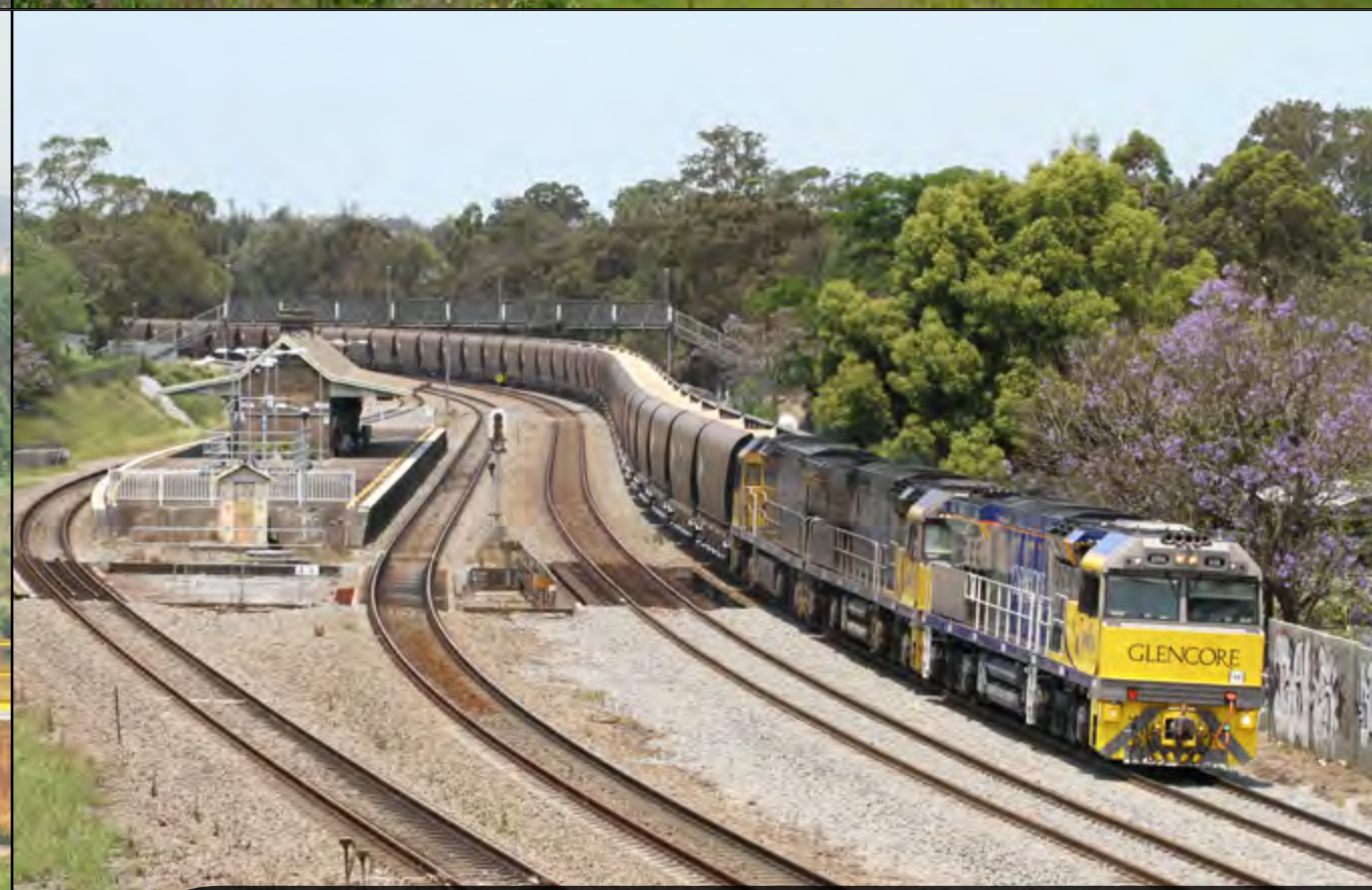
Glencore's GE Transportation's C44aci design Nos. XRN026, XRN023 and XRN019 pass through East Maitland station on November 19th.