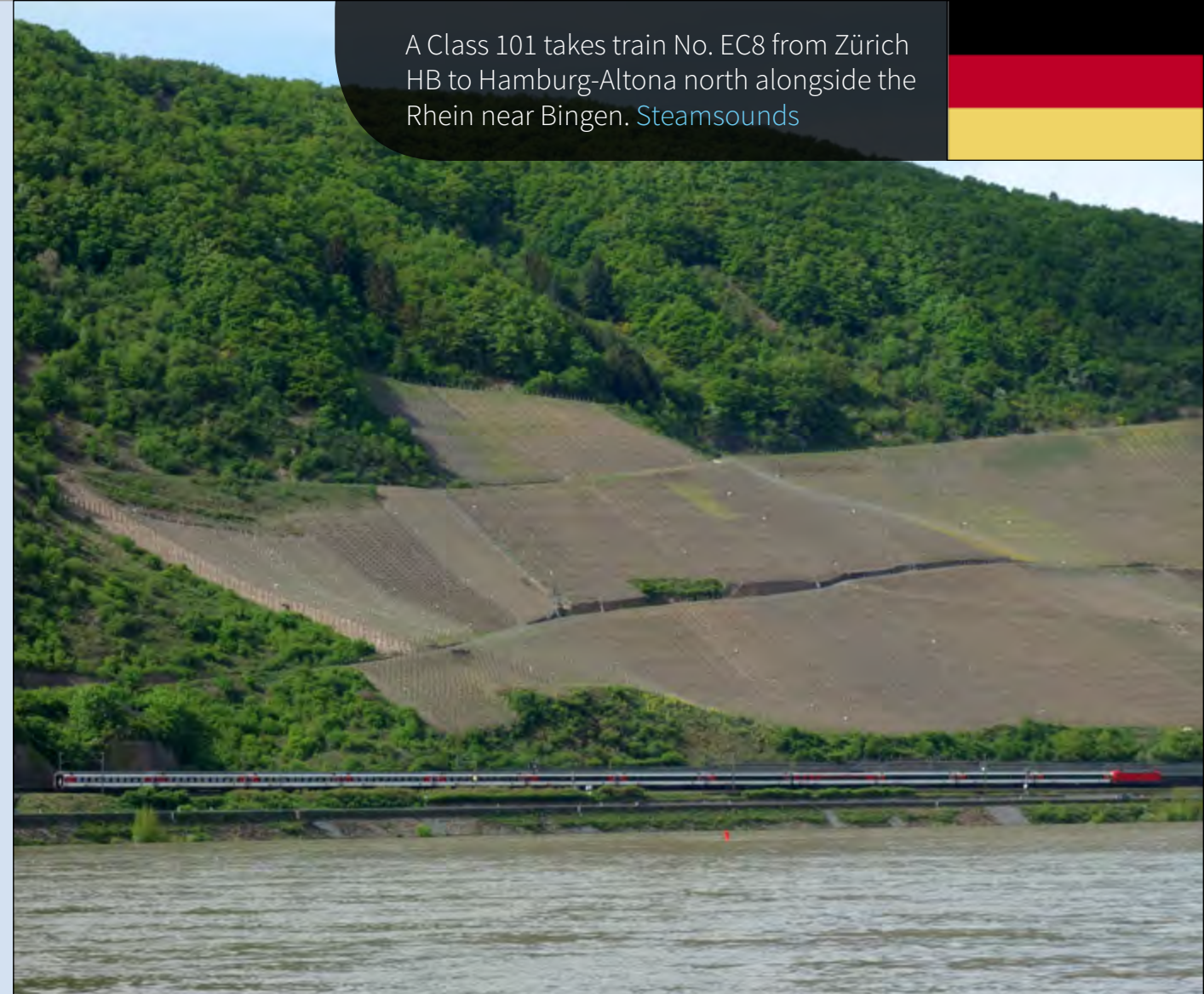
A Class 101 takes train No. EC8 from Zürich HB to Hamburg-Altona north alongside the Rhein near Bingen.

The project, which will take two-and-a-half years to be completed, will allow the operator to manage the circulation of trains safely and in accordance with the latest regulations governing computerised interlocking systems. Passengers will not only benefit from the greater safety, but also from the greater punctuality of the trains. The project will be managed by Alstom's Italian sites: the centre of excellence in Bologna and the R&D centre in Bari, which will collaborate with Charleroi site in Belgium.