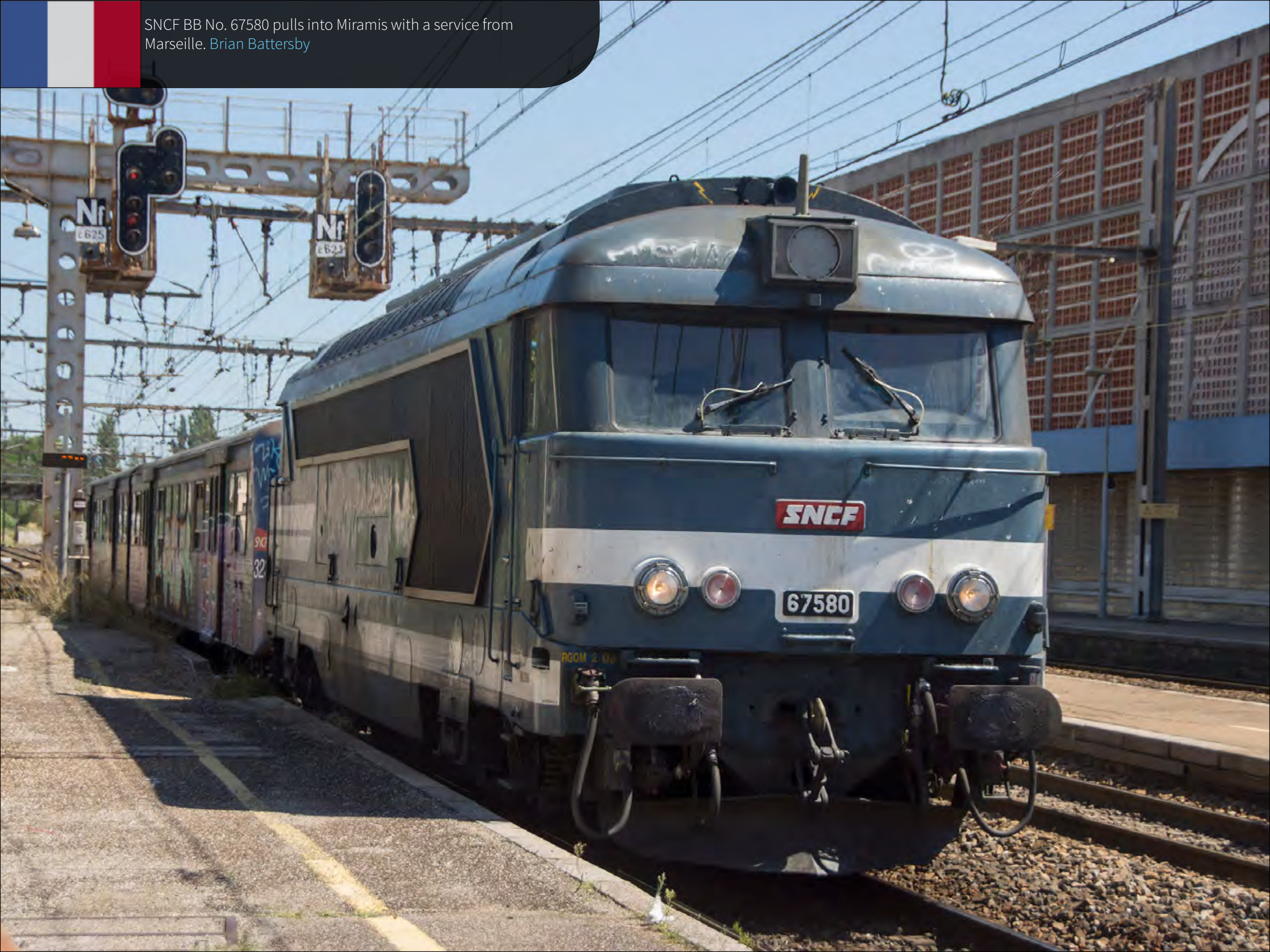
SNCF BB No. 67580 pulls into Miramis with a service from Marseille.