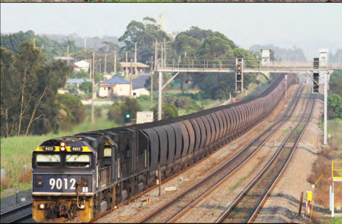
Pacific National No. 9012 leads a loaded coal train through Tarro, heading into the coal handling plants in Newcastle on November 19th. Anton Kendall