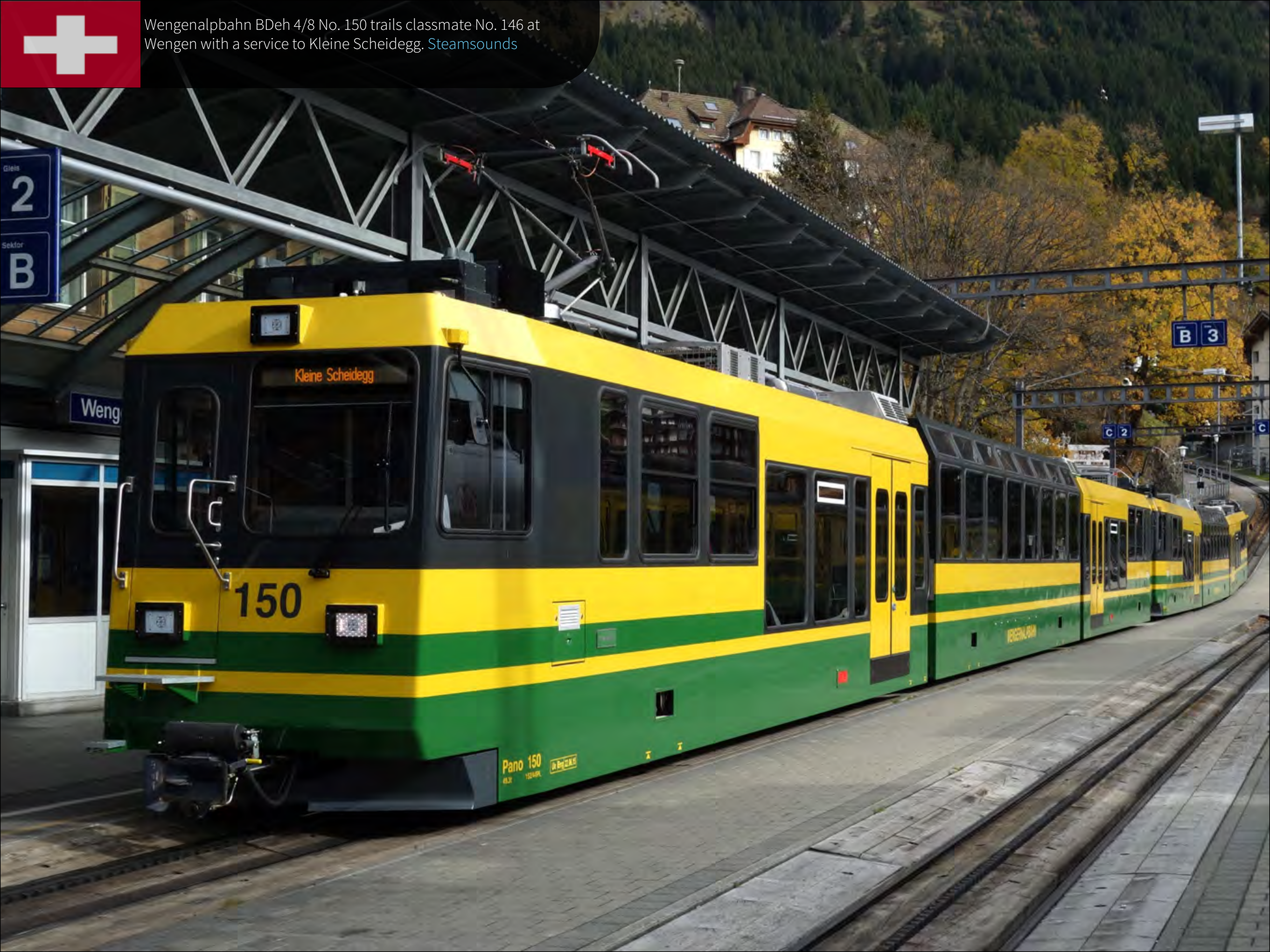
Wengentalbahn BDeh 4/8 No. 150 trails classmate No. 146 at Wengen with a service to Kleine Scheidegg. Steamsounds