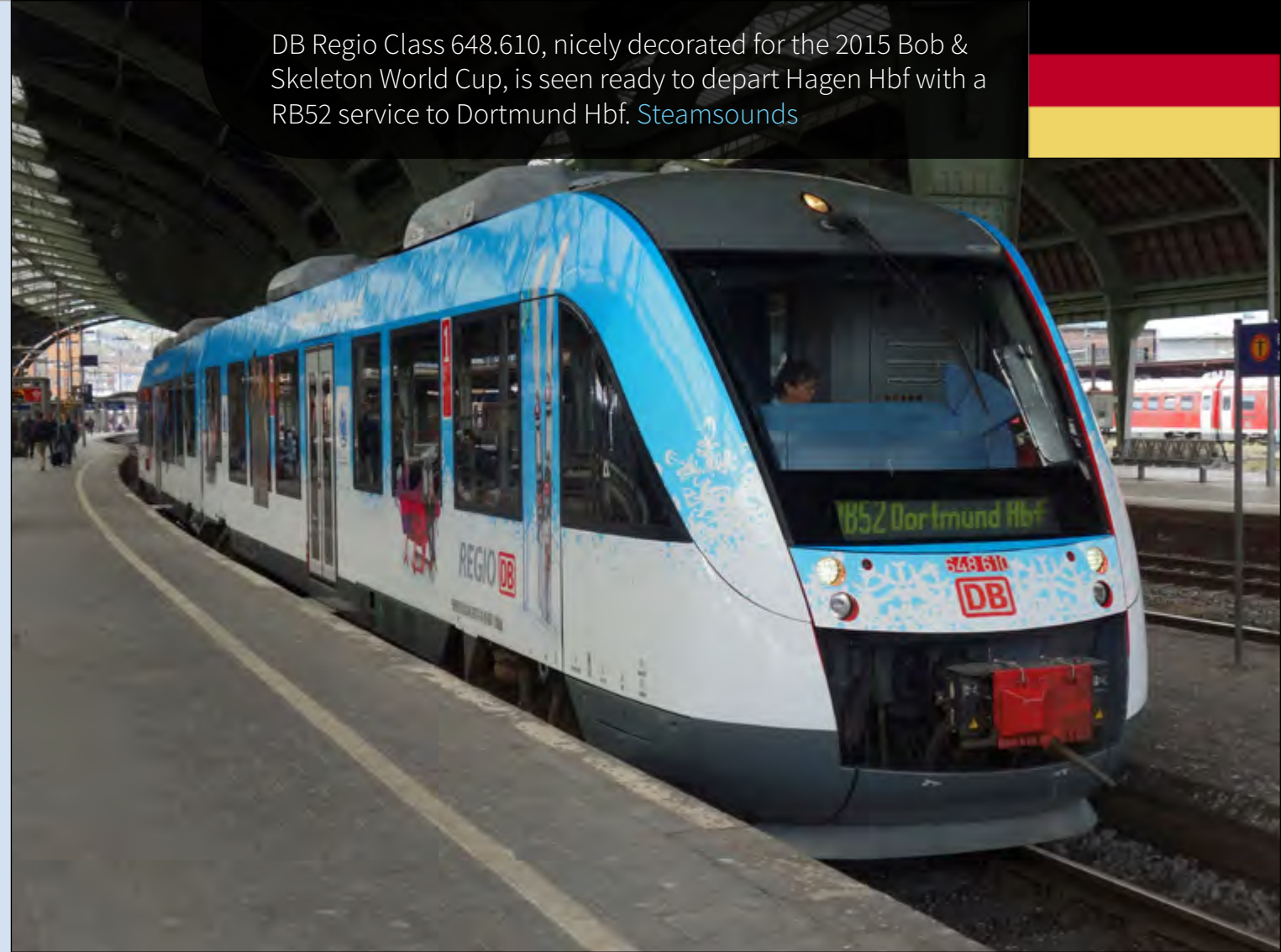
DB Regio Class 648.610, nicely decorated for the 2015 Bob & Skeleton World Cup, is seen ready to depart Hagen Hbf with a RB52 service to Dortmund Hbf.