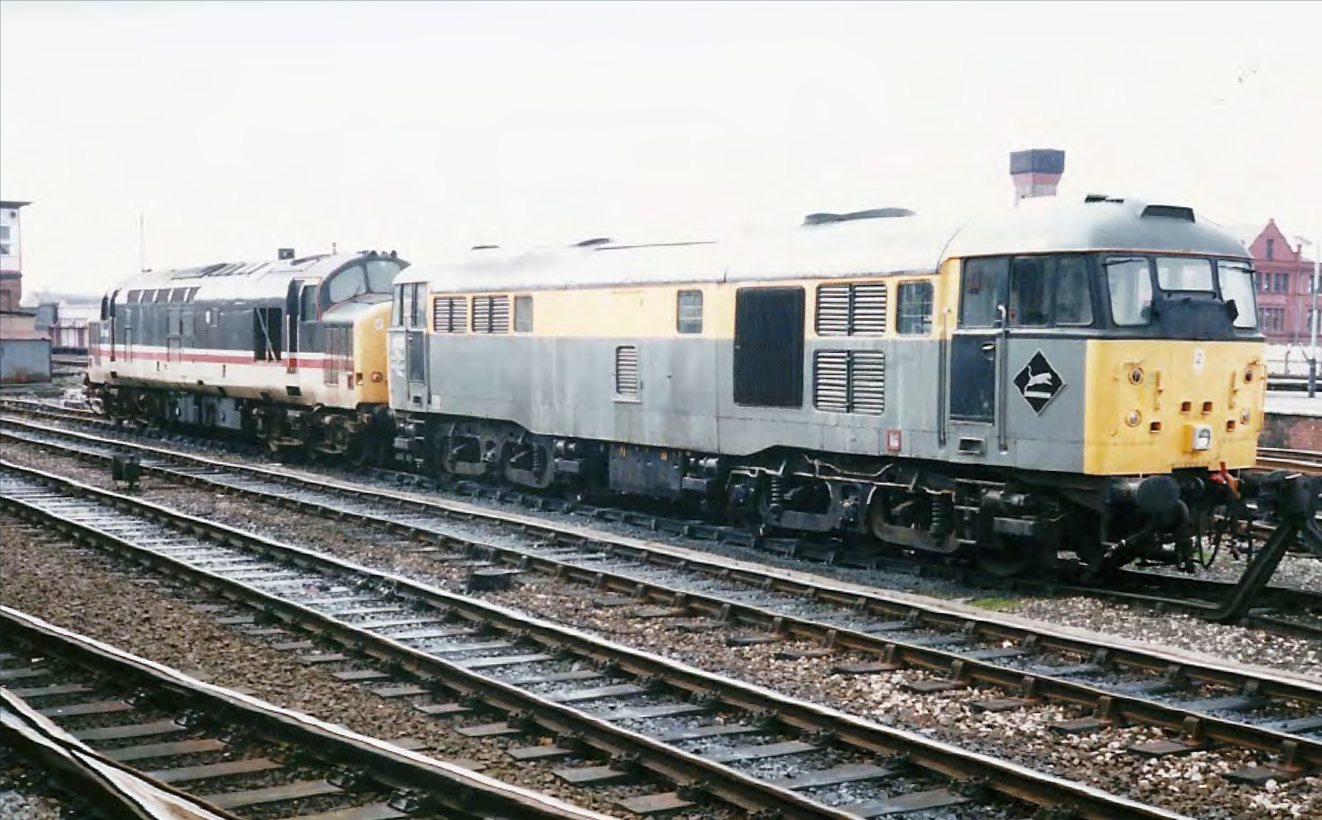
Class 31 125 and 37 426 are seen stabled at Manchester Victoria on April 6th 1992. Michael Lynam