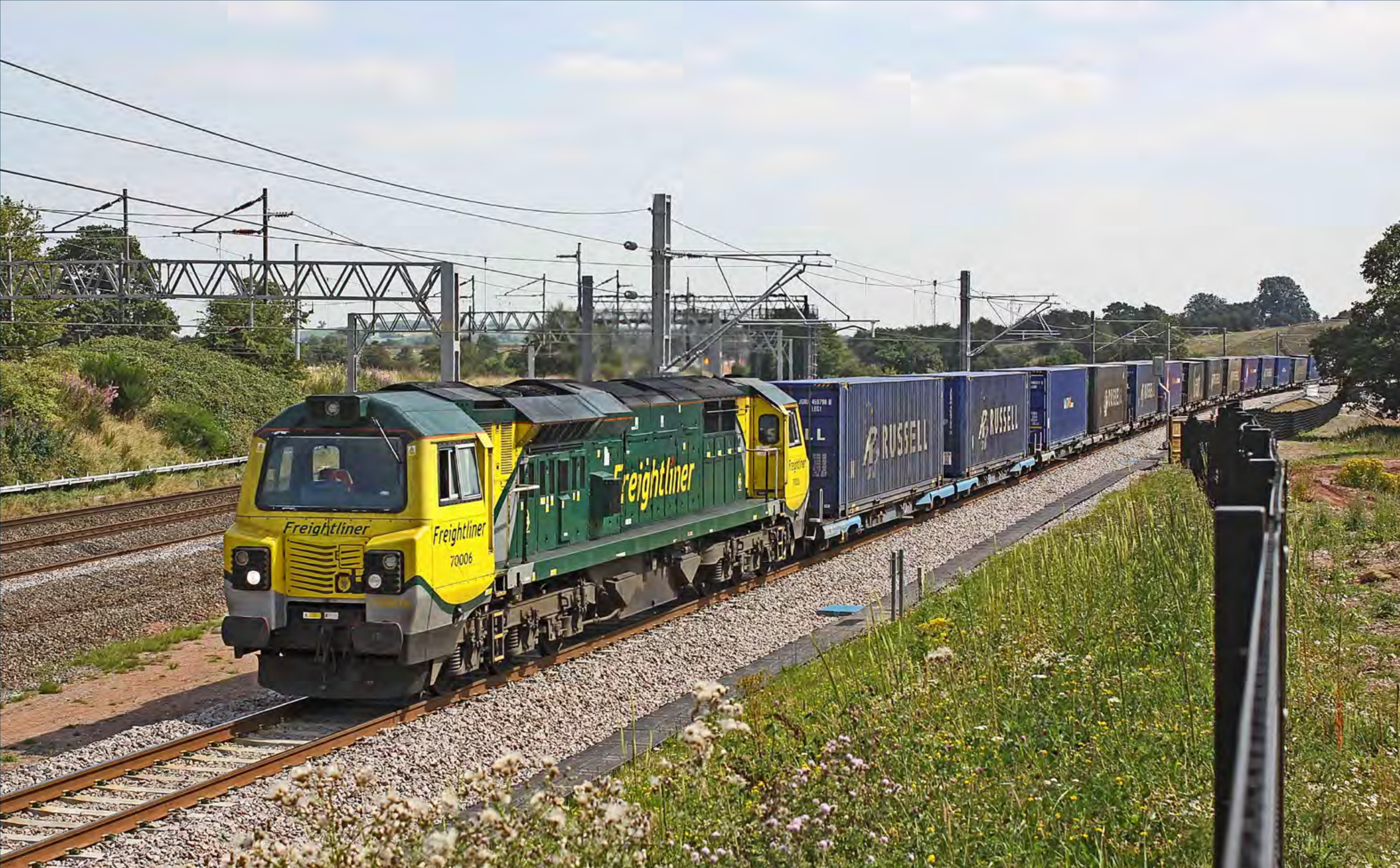
▶ Class 70 006 comes off the new deviation near Heamies Farm with 4Z44 12:13 Daventry International - Coatbridge FLT on August 15th. Nick Clemson