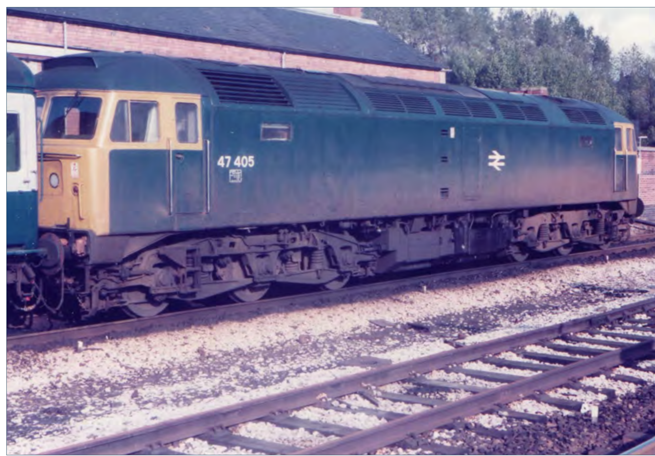
In days of proper trains on Trans Pennine services, Class 47 405 calls at Stalybridge on October 22nd 1981 working a Newcastle bound service.