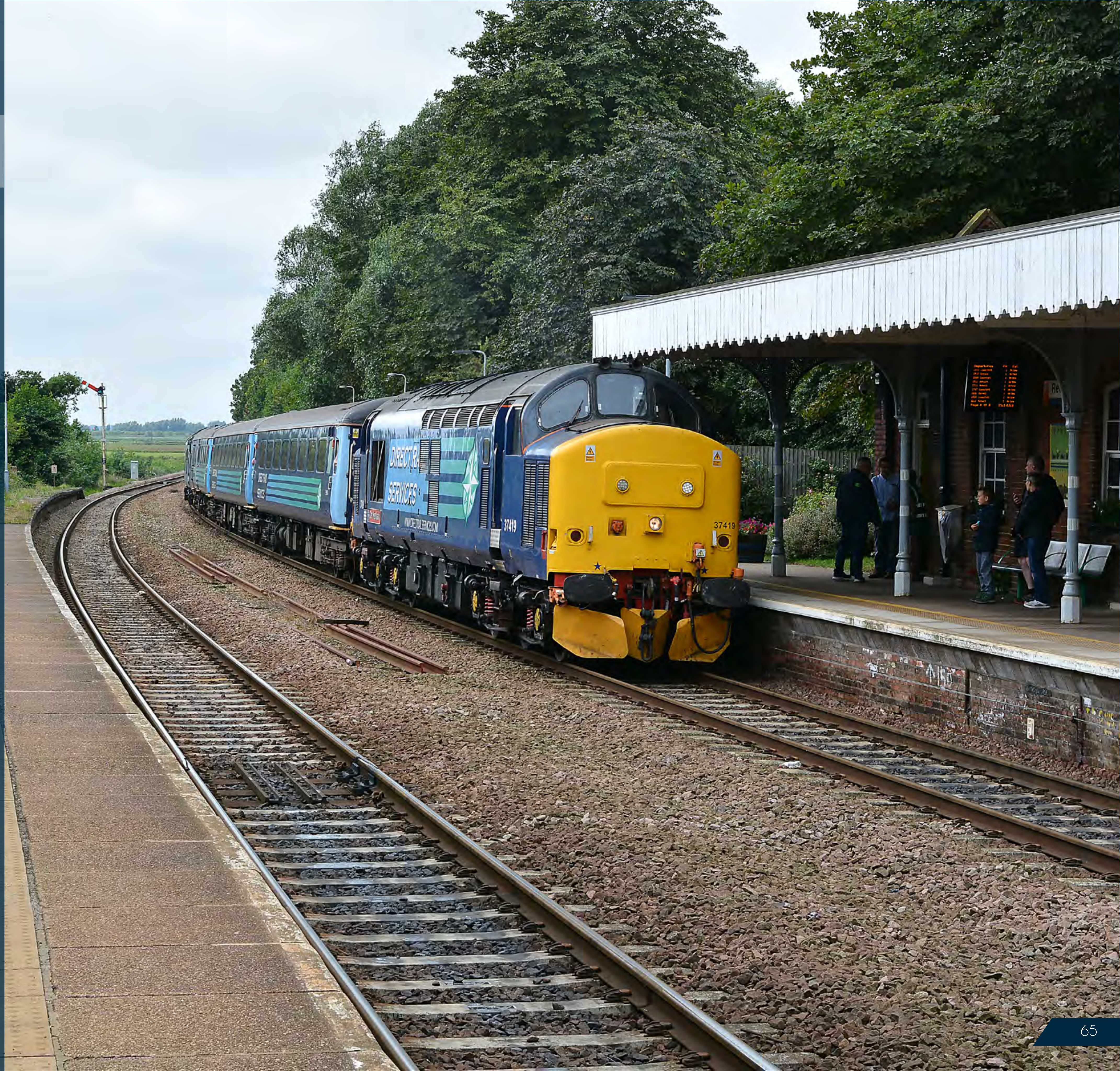
Class 37 419 pulls into Reedham station (with 37 422 on the rear) working a Lowestoft service on August 11th. Charlie Robbins