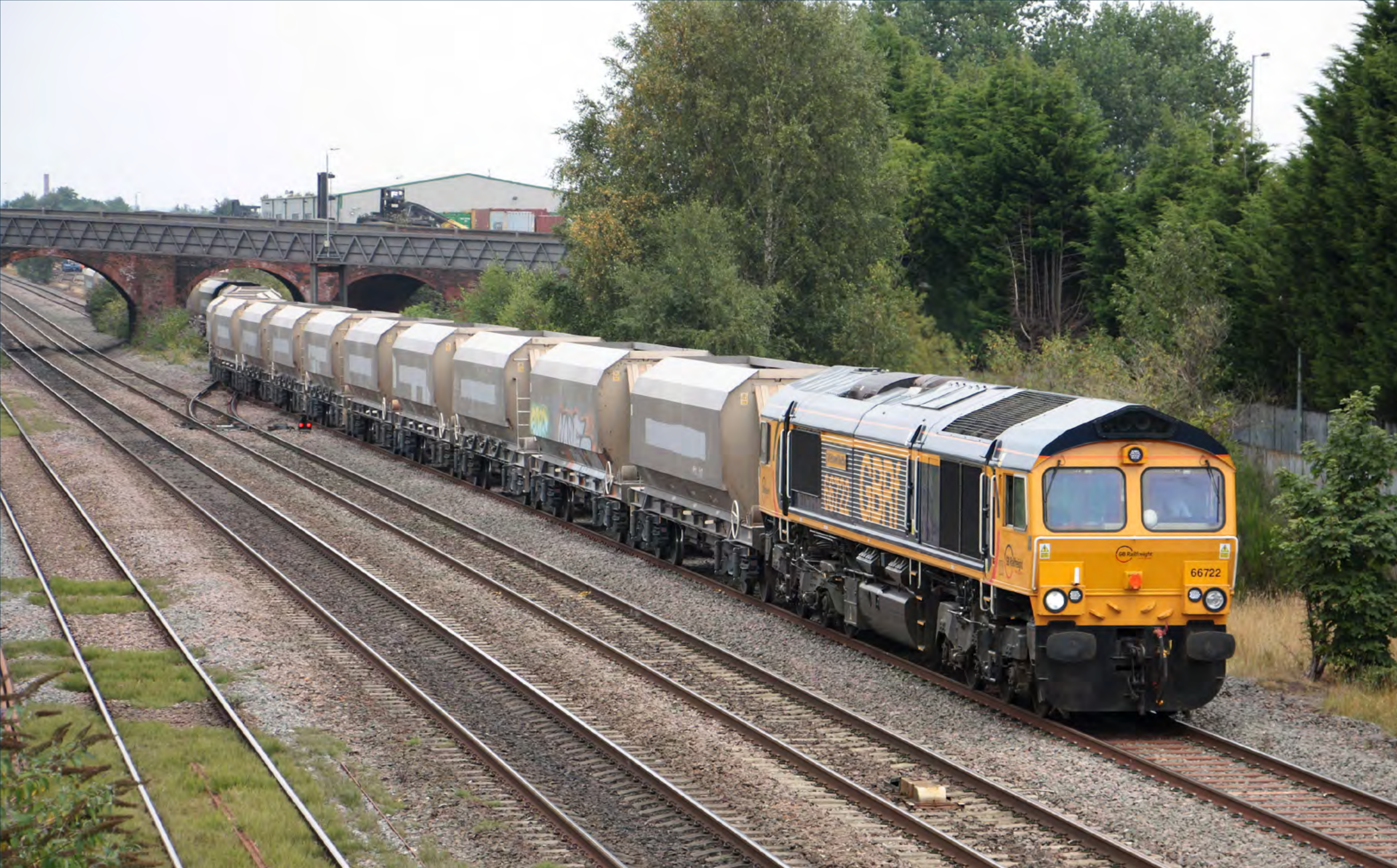
▶ Class 66 722 'Sir Edward Watkin' works 6M83 Tinsley - Bardon Hill empty hopper wagons at Burton on August 18th.