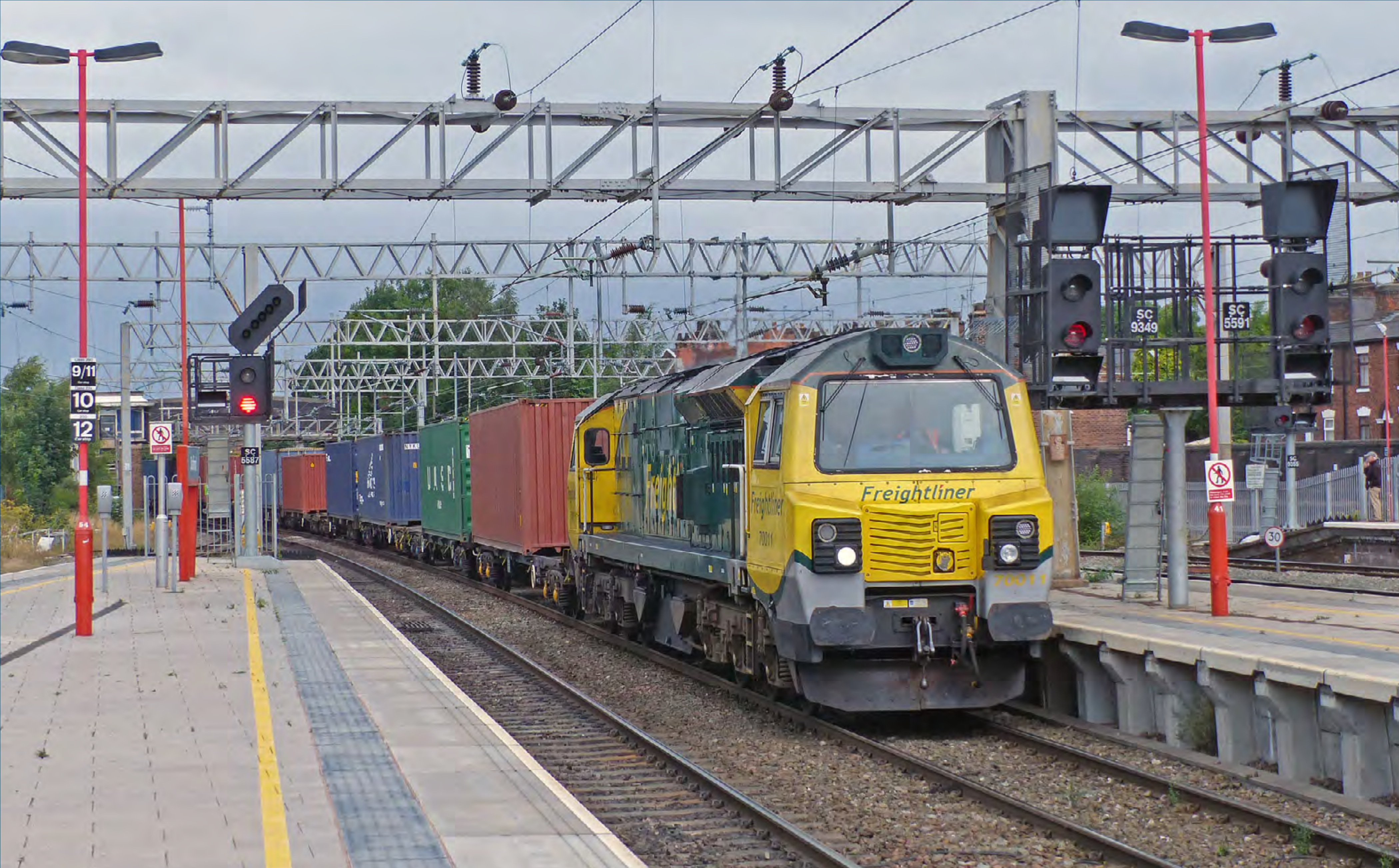
Class 70 011 eases a Crewe - Southampton liner through Stafford on August 11th.