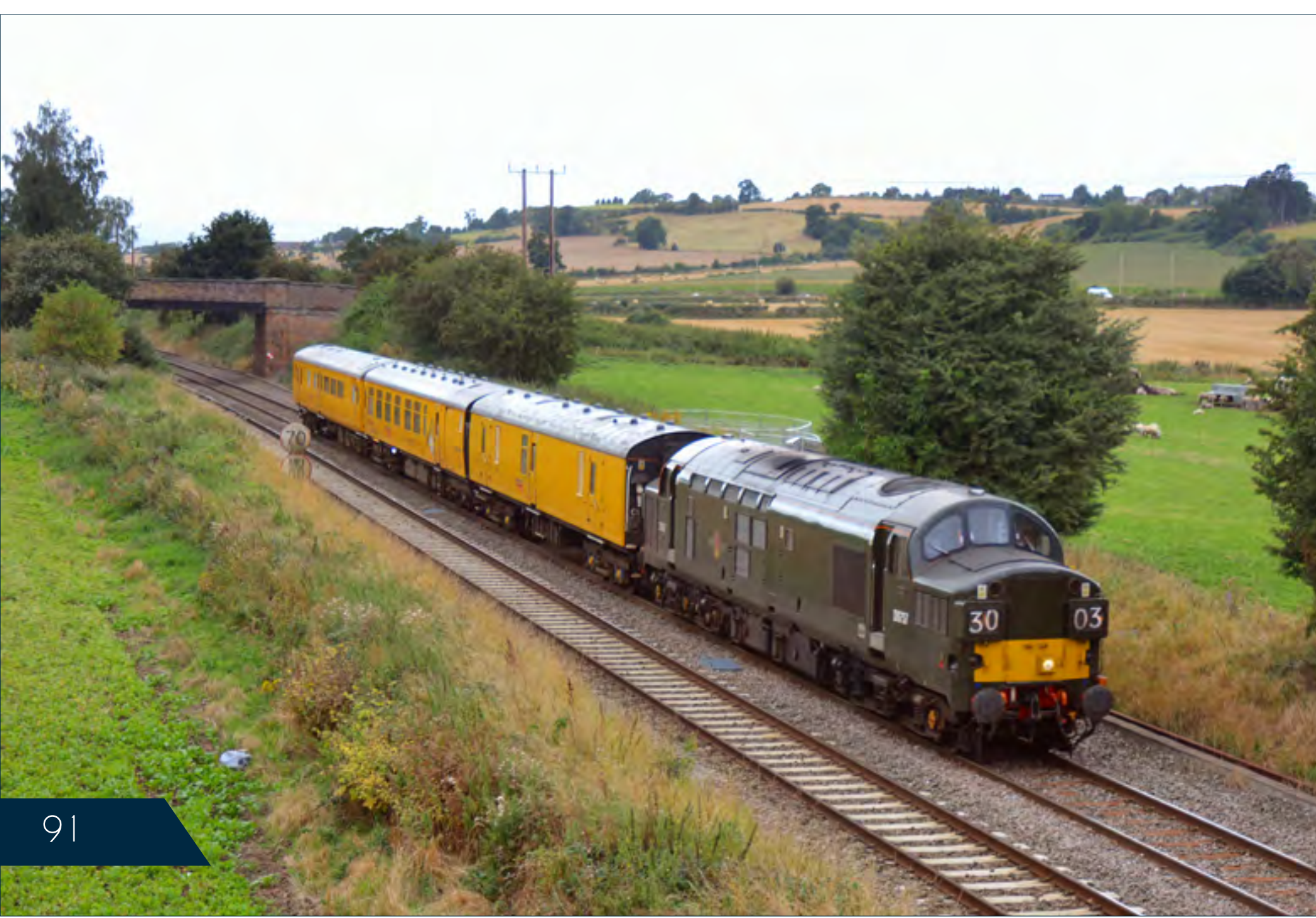
Class 37 603 passes Kempsey Shrewsbury with the 3Z01 15:22 Pengam Sidings - Coleham on August 11th.