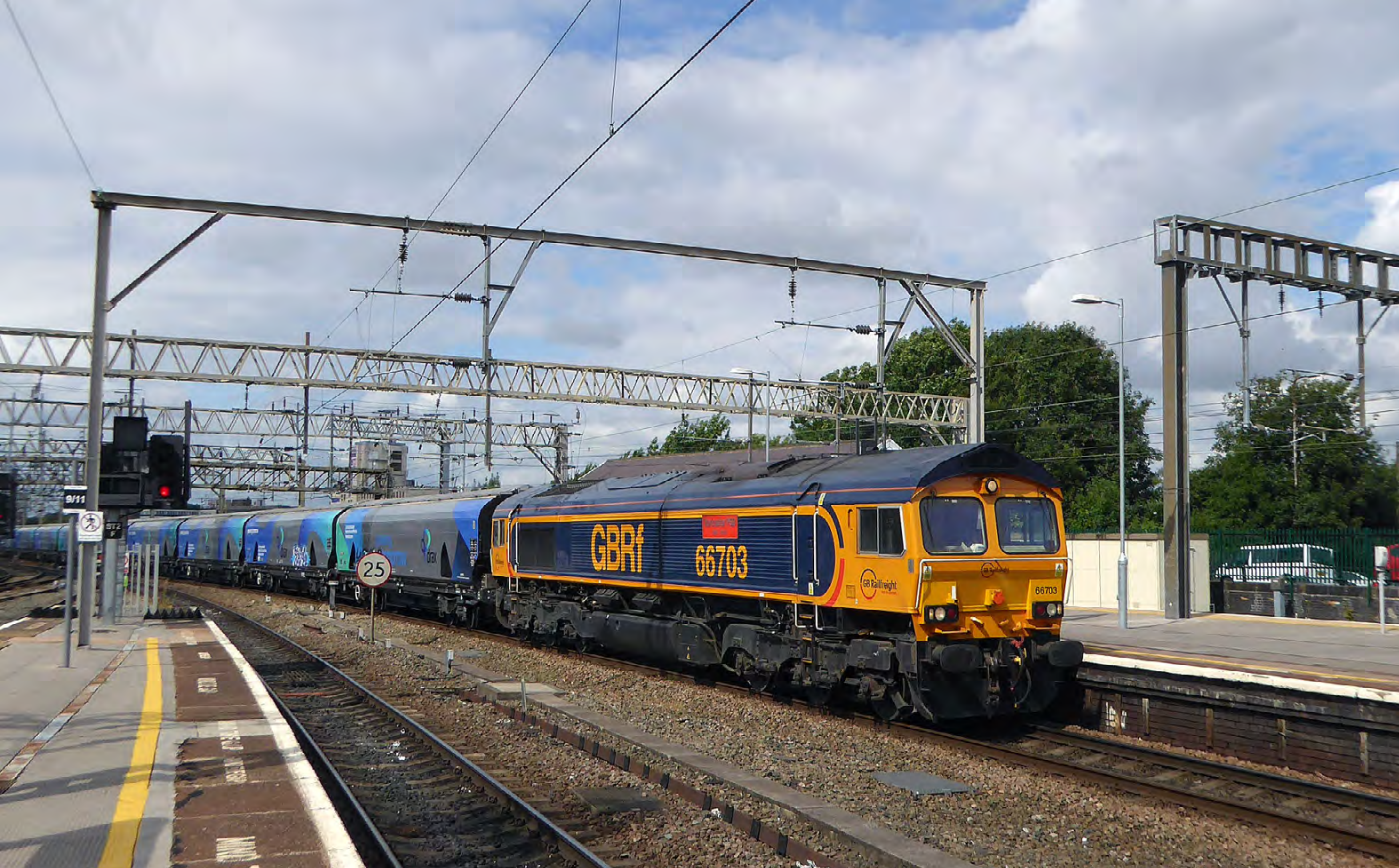
▶ Class 66 703 passes through Stockport on August 10th with a Liverpool - Drax power station Biomass. Michael Lynam