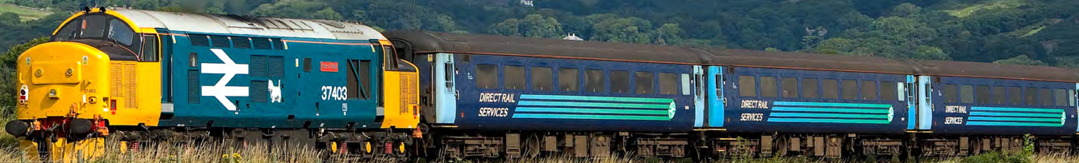
Class 37 403 working the 2C40 Carlisle - Barrow, heads past Green Road on August 6th. Carl Grocott