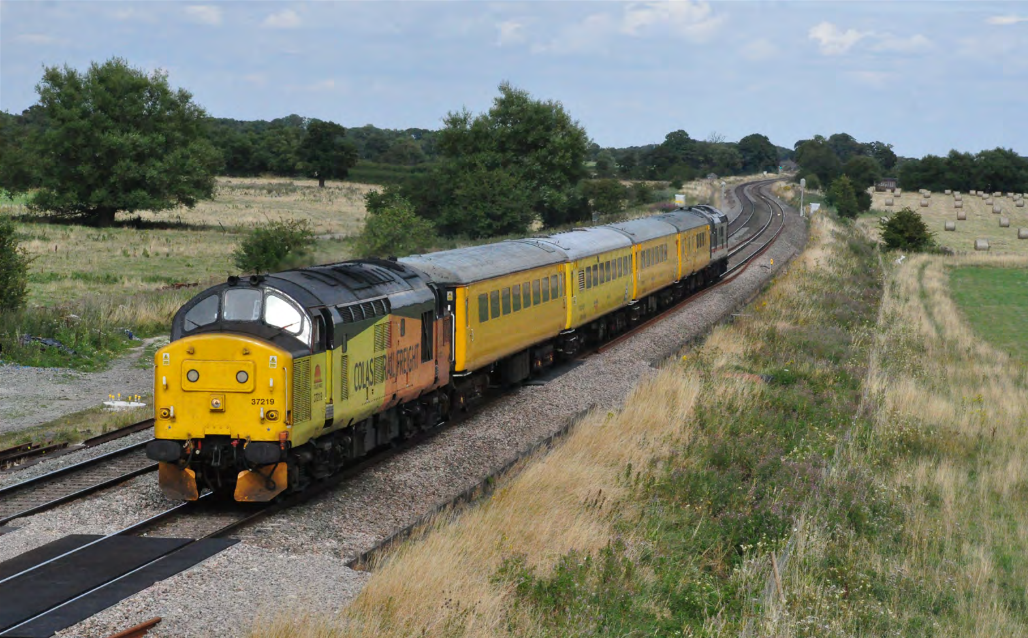
On August 10th, Class 37 219 and 37 254 top'n'tail a test train on a round the system jaunt, passing Ashbury Crossing (Shrivenham) heading for Bristol. Ken Mumford