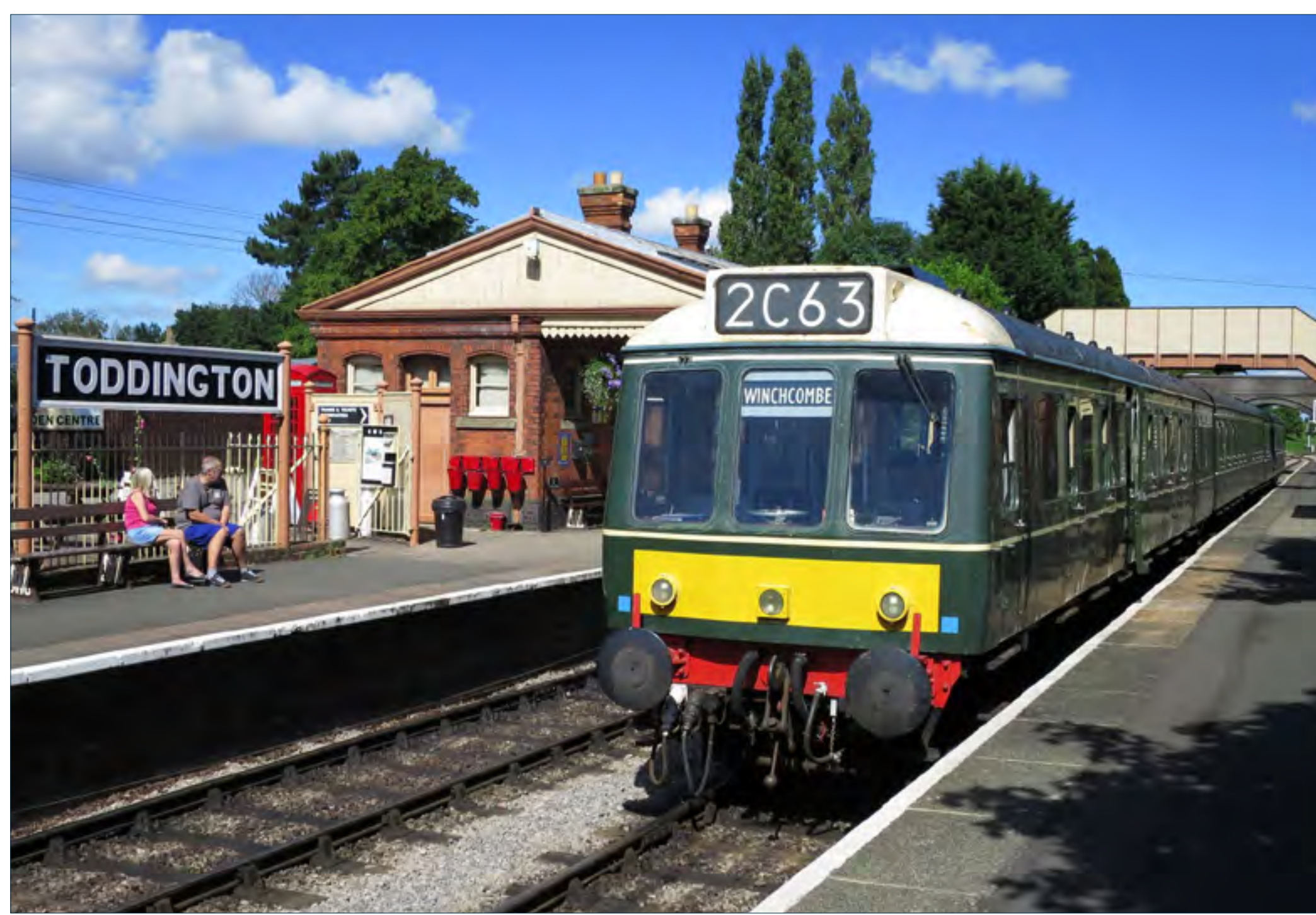
Class 117 DMU, comprising cars W51405 (DMS), W59510 (TCL), W51363 (DMBS), is seen in glorious sunshine at Toddington on August 29th waiting departure time with a service to Winchcombe.