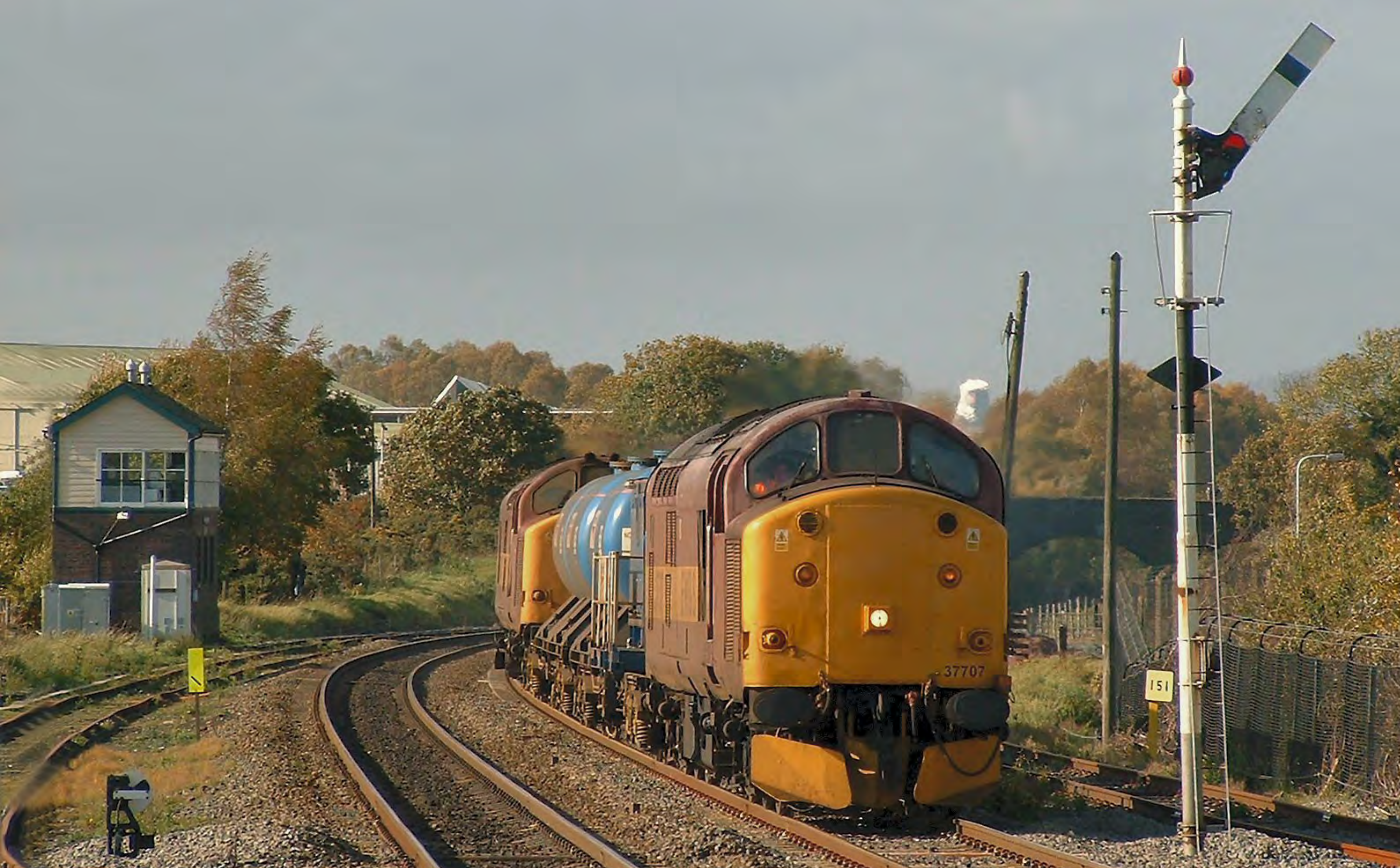
▶ Class 37 707 and 37 895 top'n'tail the 1Z96 11:48 Nantwich - Bescot RHTT working through Cosford on October 24th 2004. Carl Grocott