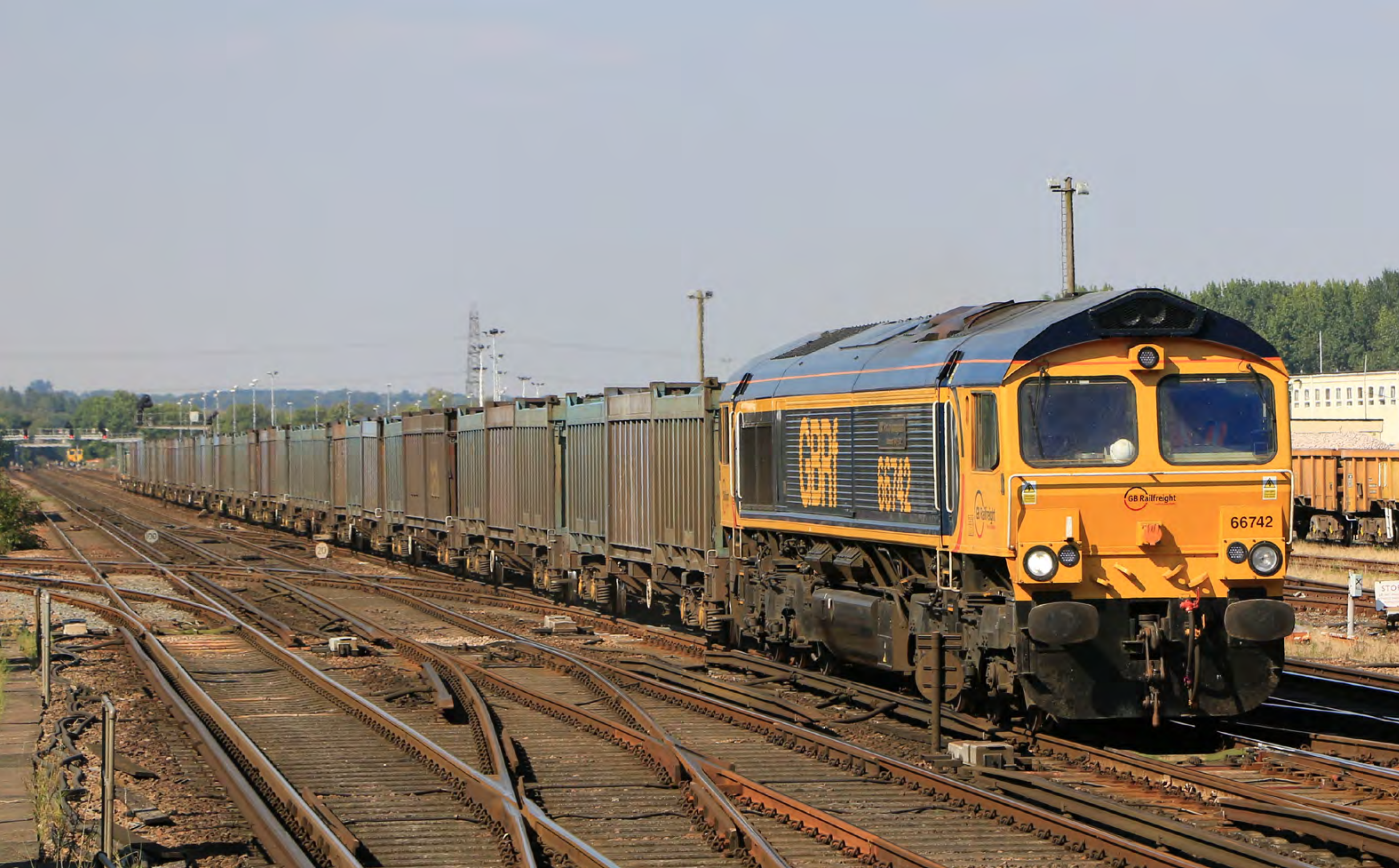
▶ Class 66 742, working a Mountfield to Southampton Docks loaded Gypsum train, passes through Eastleigh on August 17th.