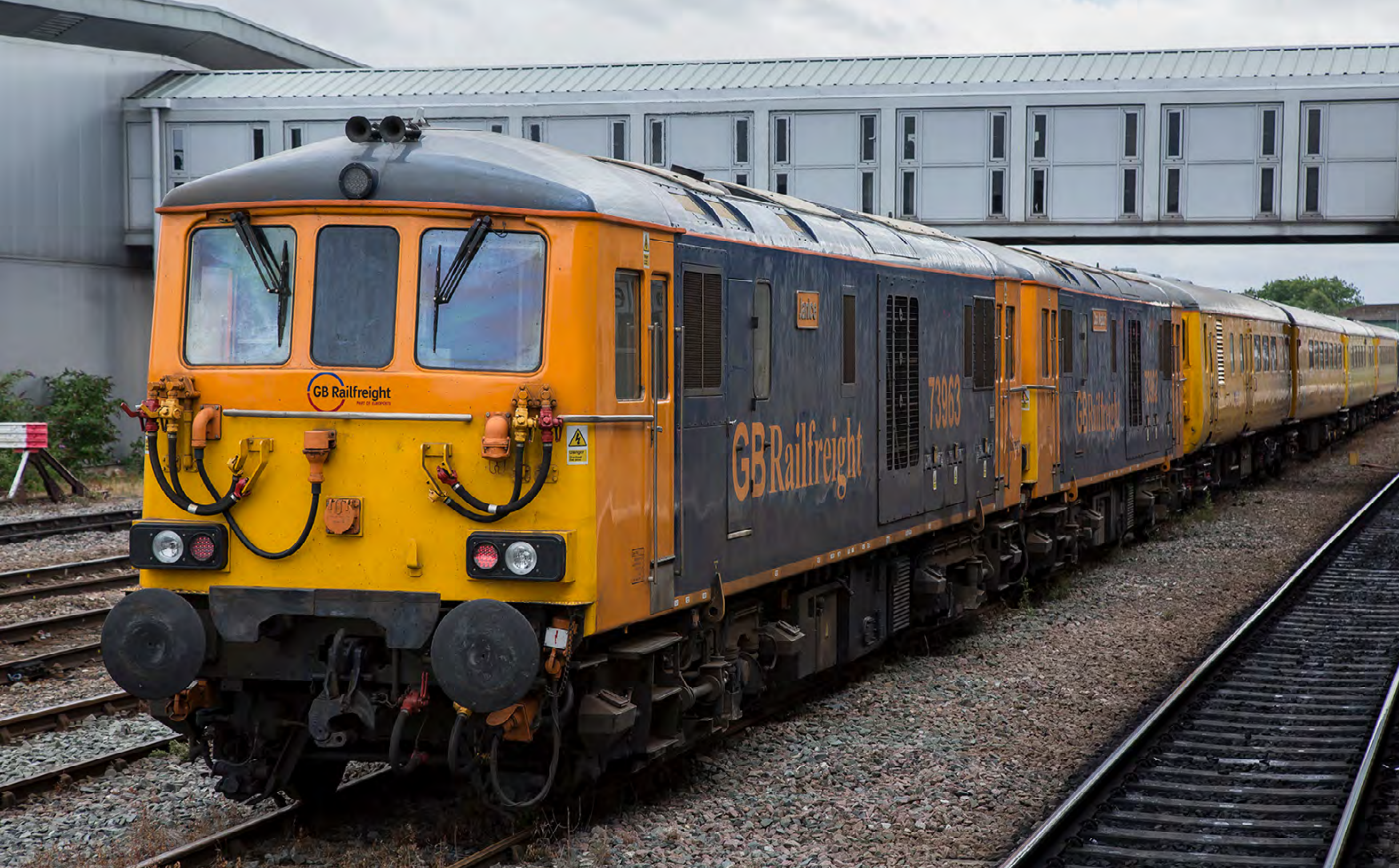
▶ Class 73 962 and 73 963 (with 73 965 on the front) are seen departing Derby on August 20th with a test train working to Tonbridge.