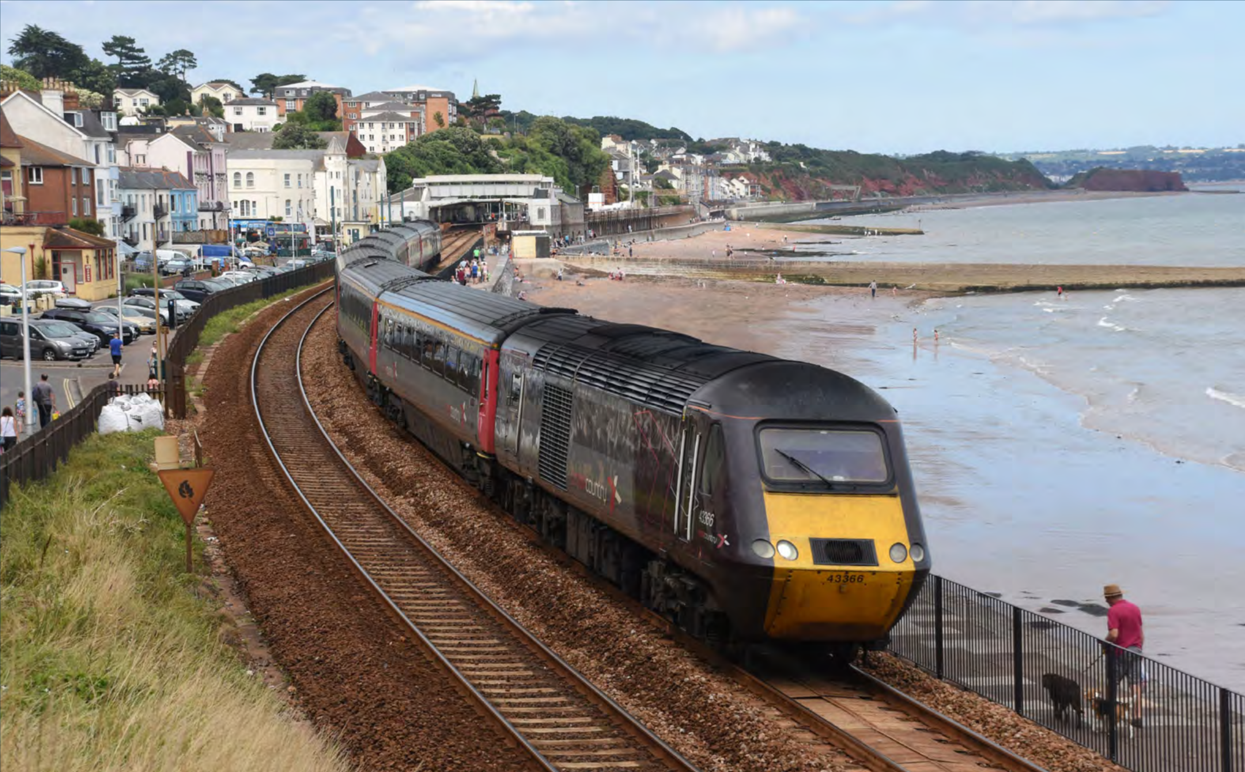
On August 6th, power cars Nos. 43366 and 43207, having waited for the sun to go in, pass by Dawlish running 18 late working the 1V54 Dundee - Newquay.