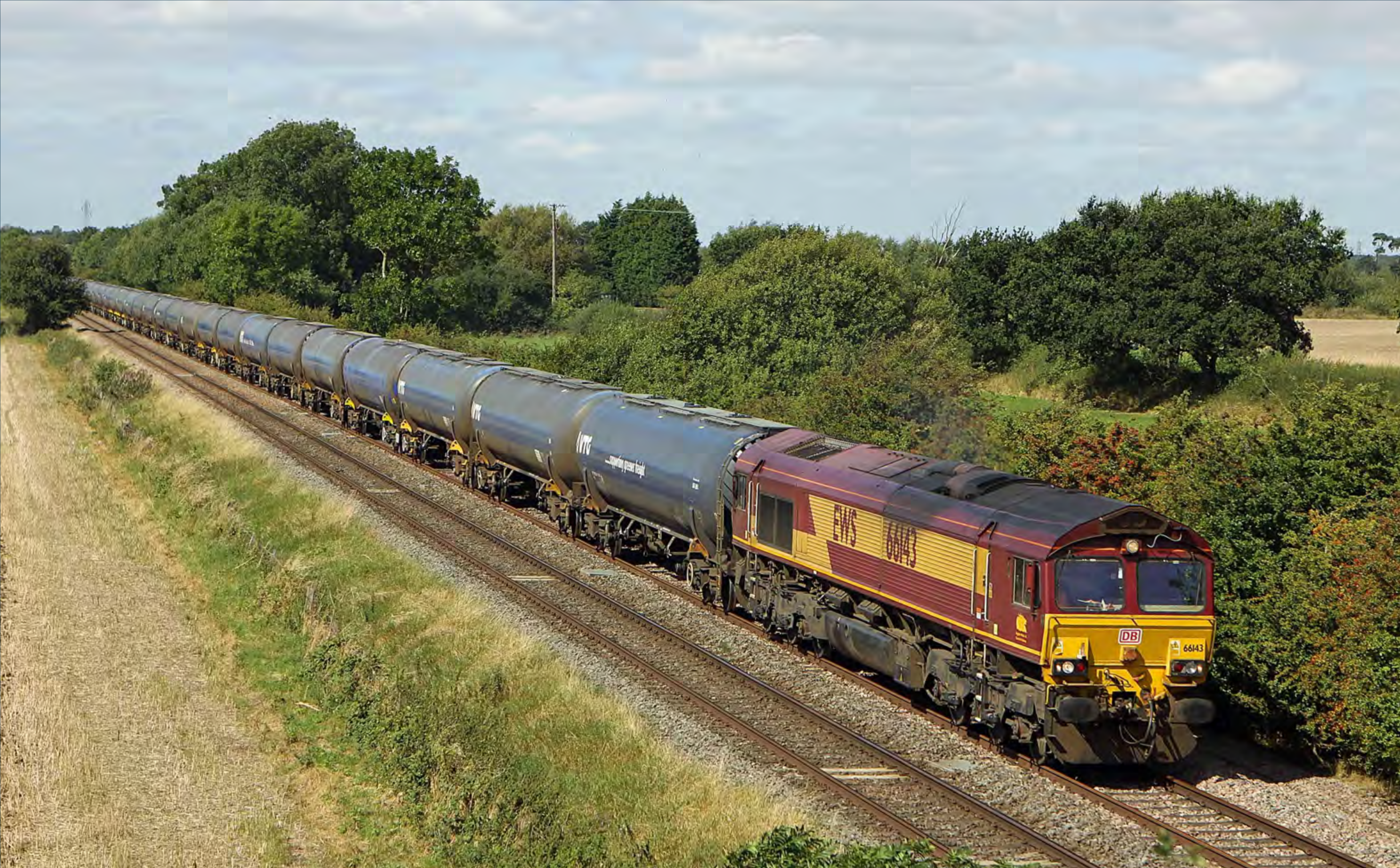
Class 66 143 passes Barrow-on-Trent with the 6E54 10:35 Kingsbury - Humber empty tanks on September 1st. Nick Clemson