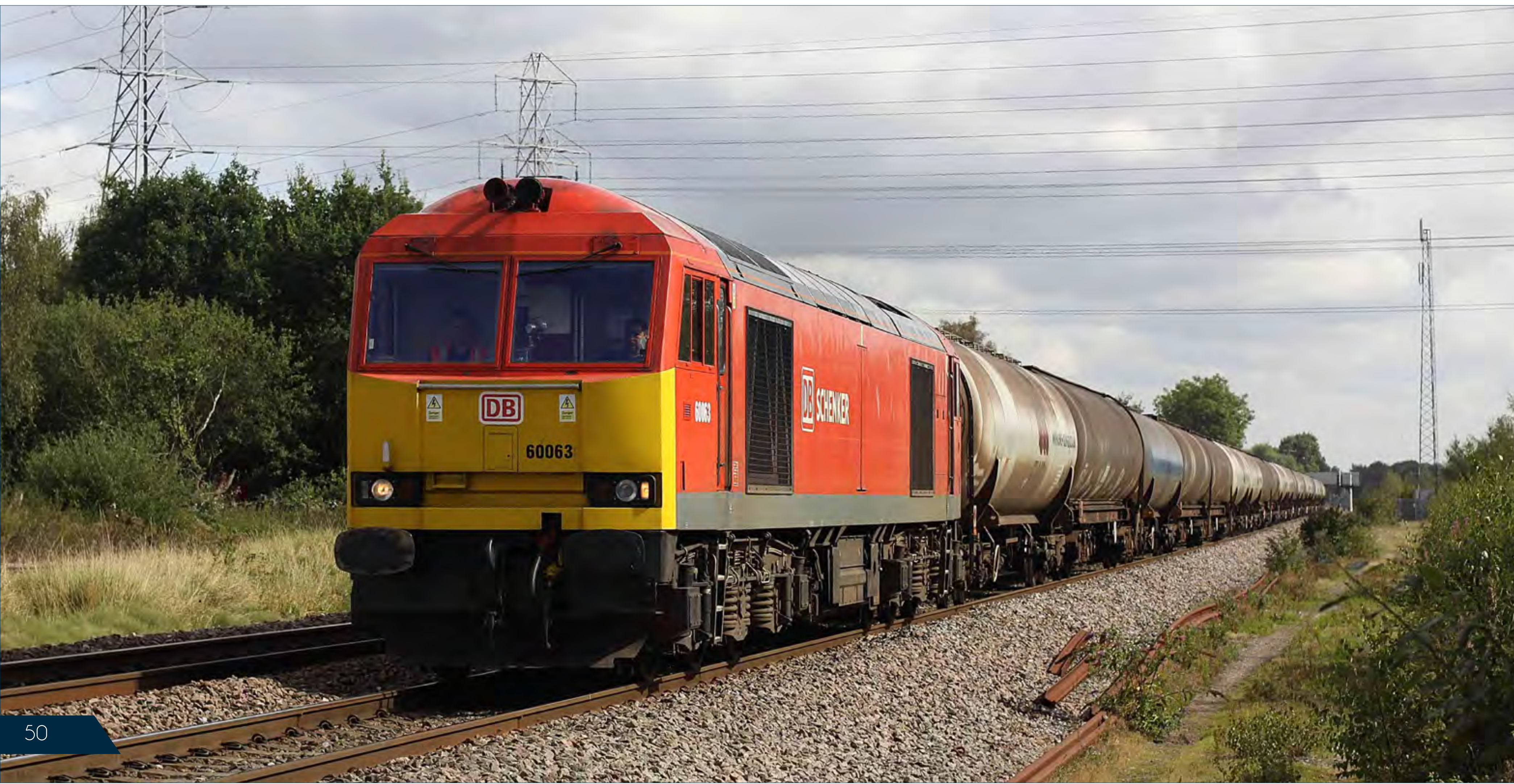
◀ Class 60 063 with the 6M57 07:15 Lindsey - Kingsbury bogie tanks, passes North Stafford Jct. on September 1st. Nick Clemson

We want the local community to know that our approach is different and supports our motto of 'helping to build a greener, greater London'. If permission is granted, we will be employing people to work on the site and introducing an apprenticeship scheme. We plan to recruit local people wherever possible."