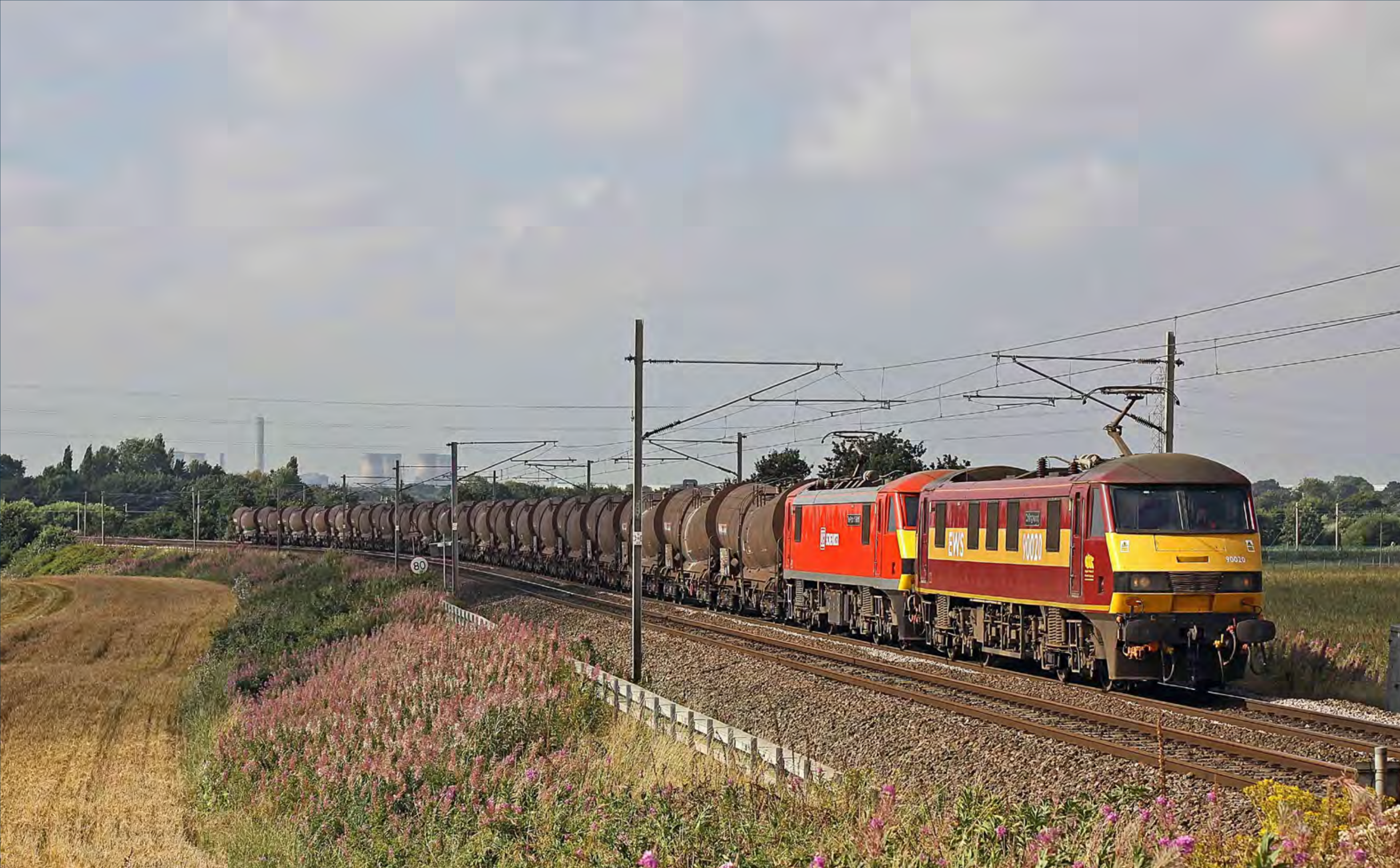
Class 90 020 and 90 018 head past Red Bank, Warrington on August 17th working the 6S94 02:32 WO Dollands Moor - Irvine china clay tanks.