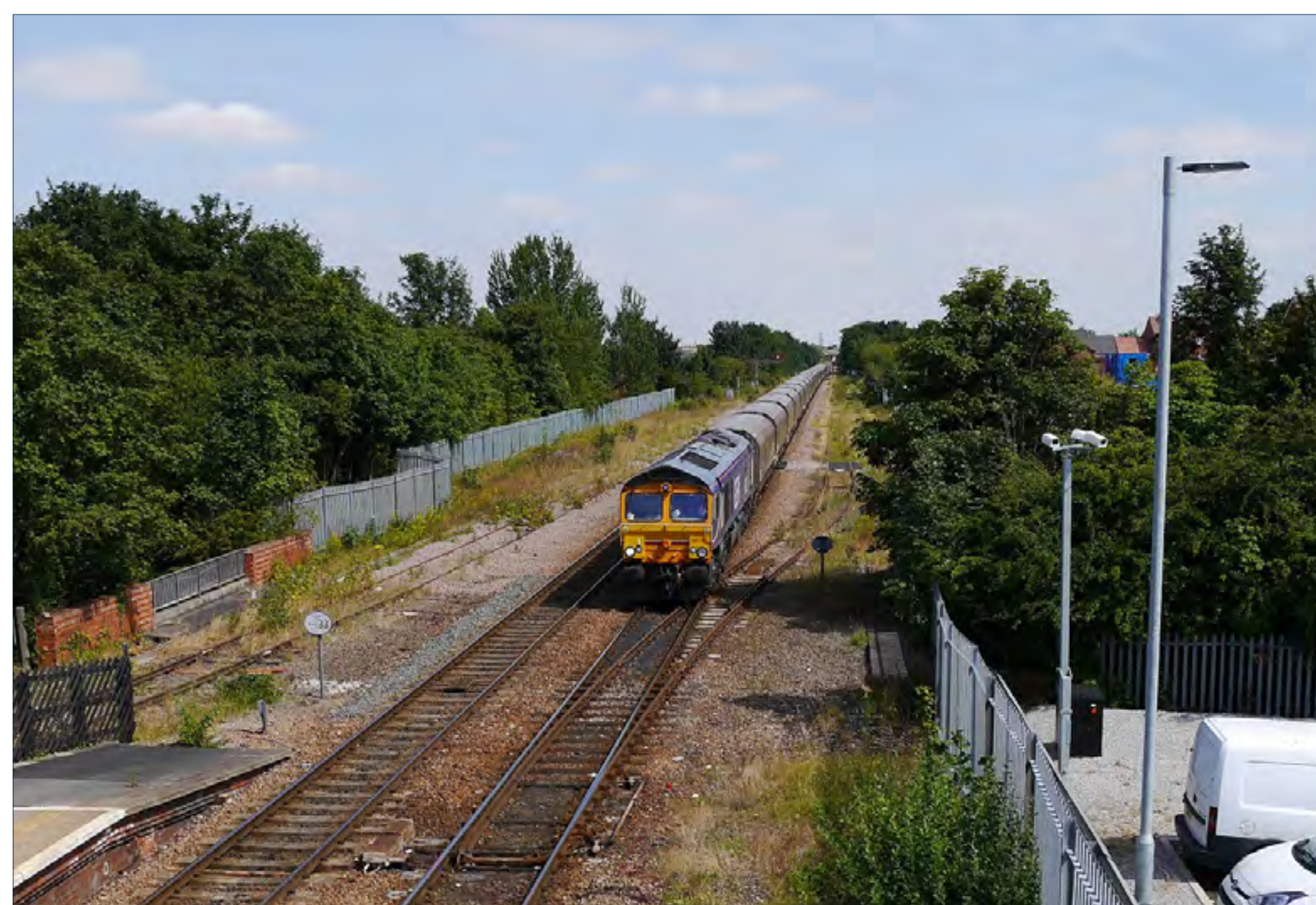
▶ Class 66 703, working a Liverpool Bulk Terminal - Drax Biomass, passes Winwick on August 8th. Alan Rigby