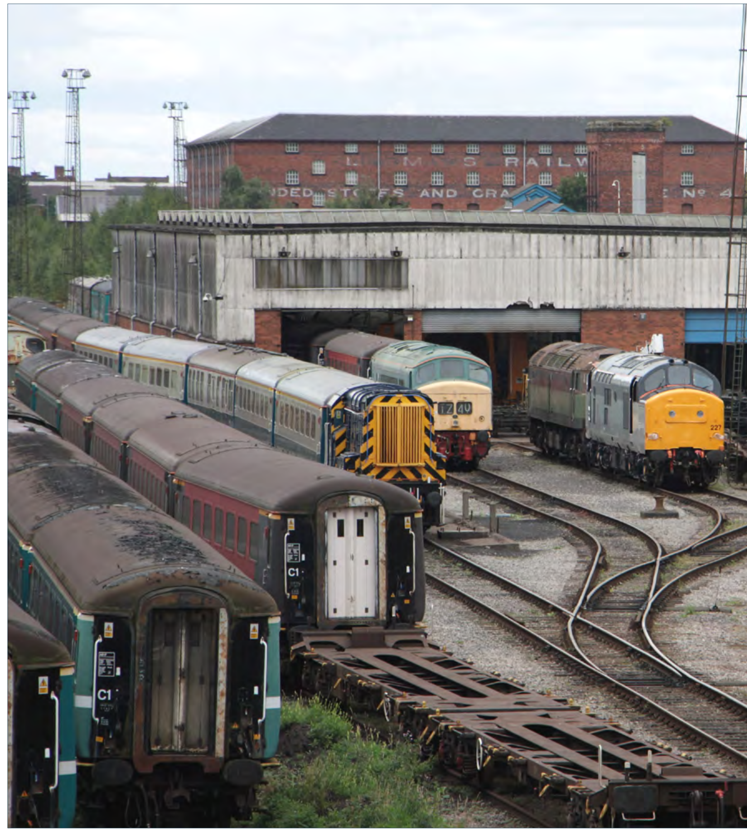
▶ A view of the Nemesis Rail with 08 704, 45 112, 47 488, 37 227 and 37 198 seen outside. Stuart Hillis