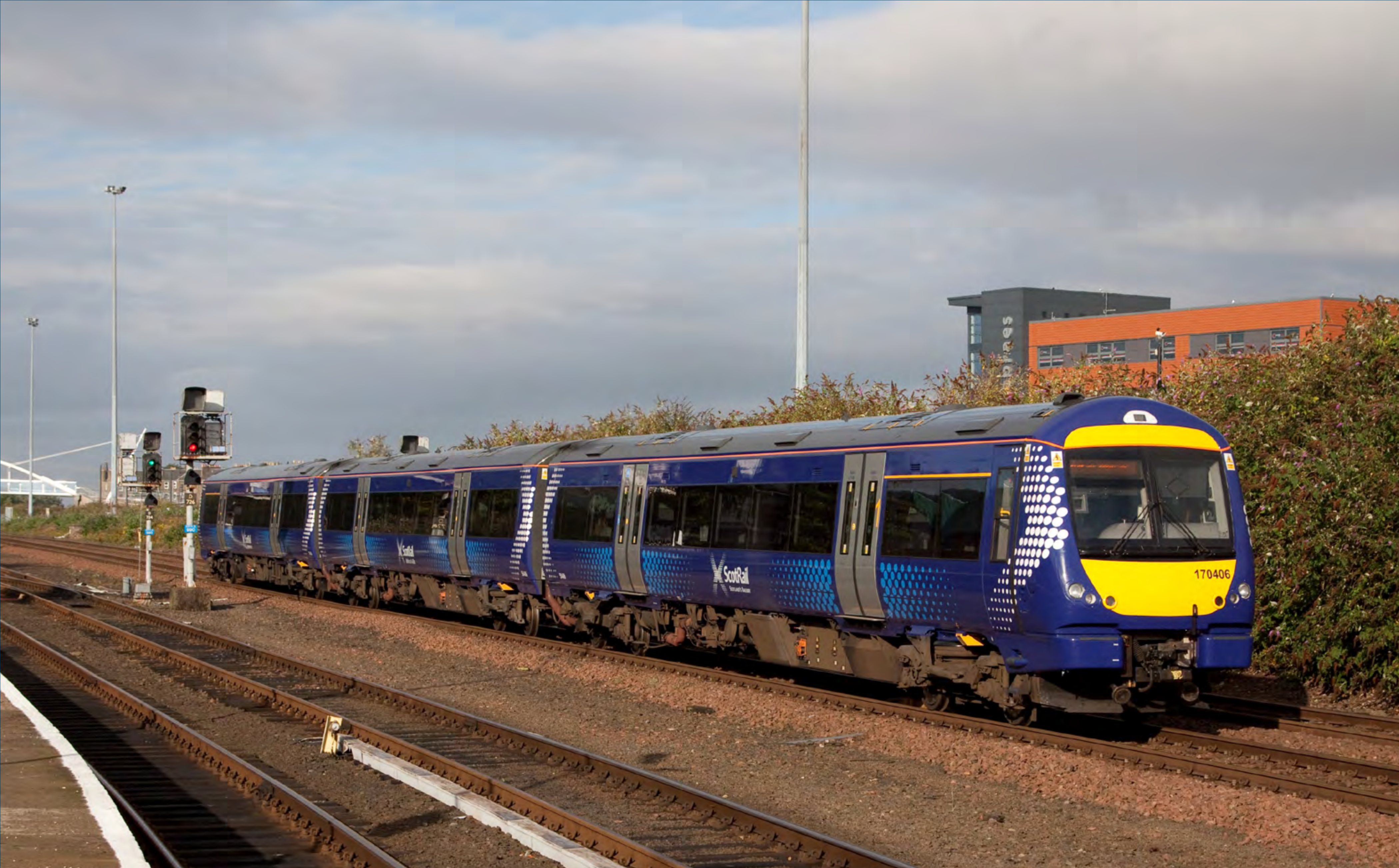
▶ On August 20th, Class 170 406 approaches Dundee with an Edinburgh service.