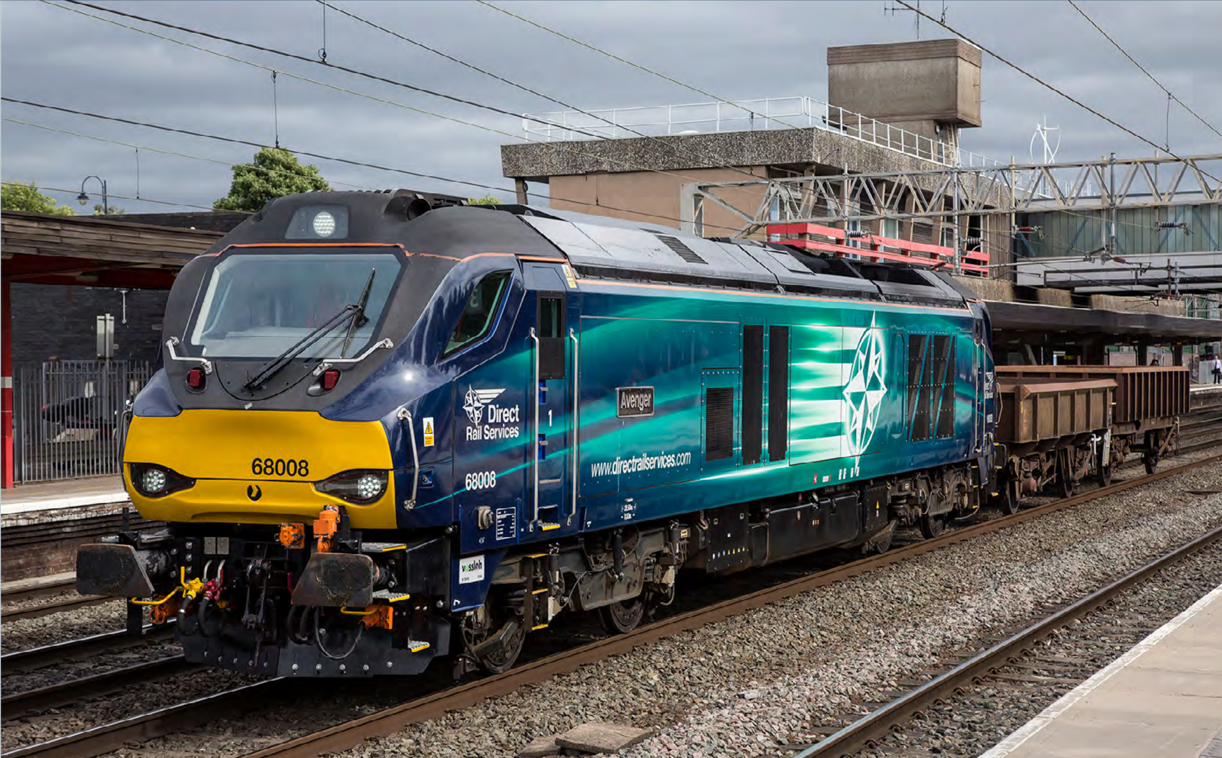
▶ A massive two wagon load for Class 68 008 as it passes through Stafford on August 11th, heading for Crewe Basford Hall.