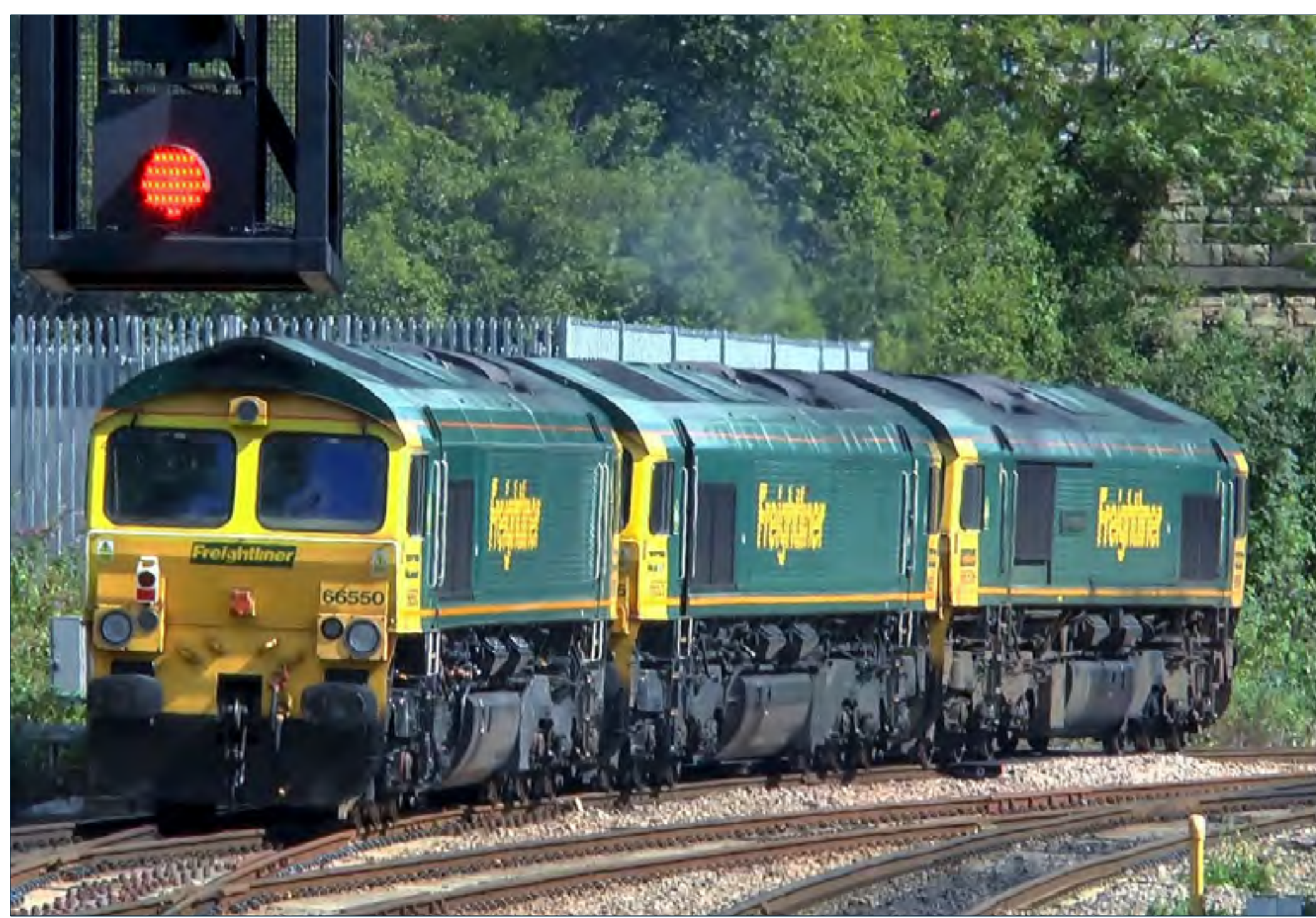
On August 29th, Class 66 506, 66 525 and 66 550 working from Crewe Basford Hall to Leeds Balm Road, head out of Stalybridge.