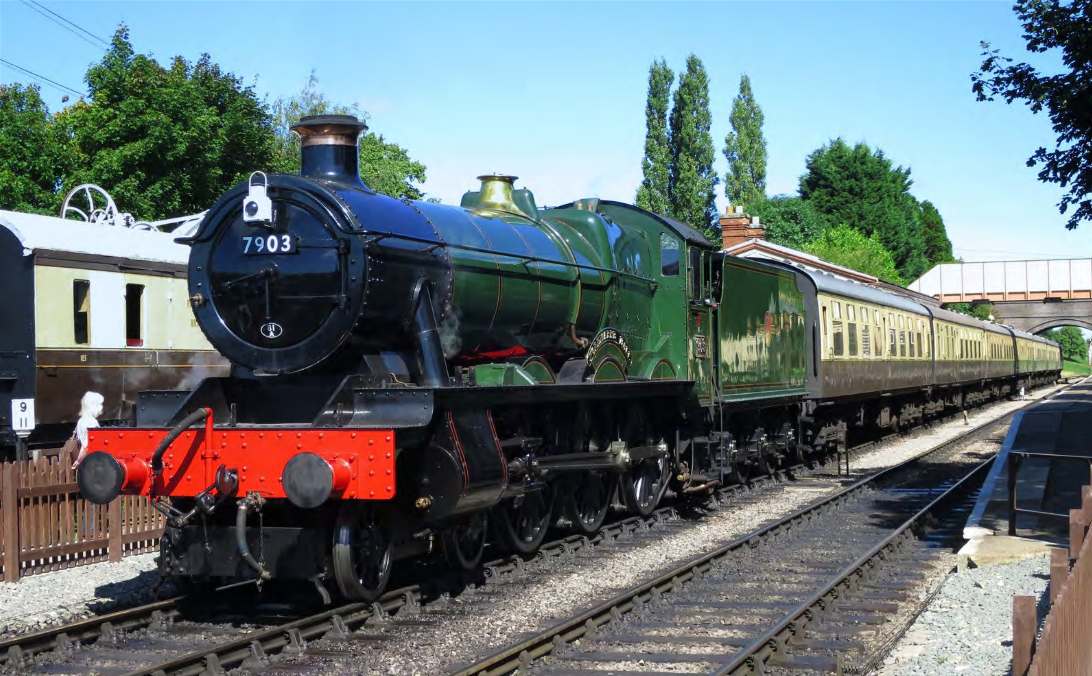
Preserved GWR Modified Hall Class No. 7903 'Foremarke Hall' stands at Toddington on August 29th.