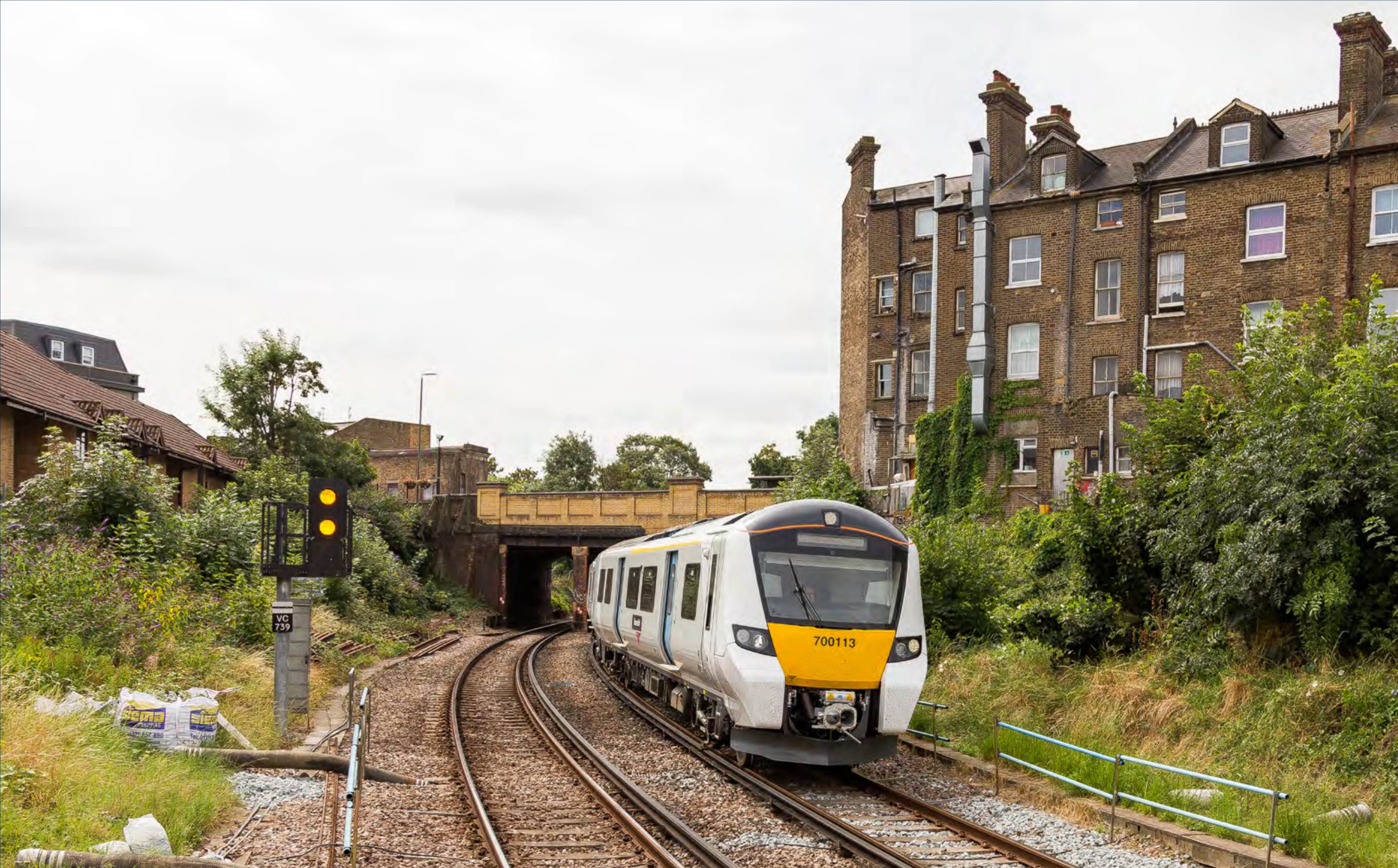
▶ Thameslink's Class 700 113 working the 2W30 10:59 Three Bridges - Bedford approaches Crystal Palace on August 11th. Jonathan McGurk