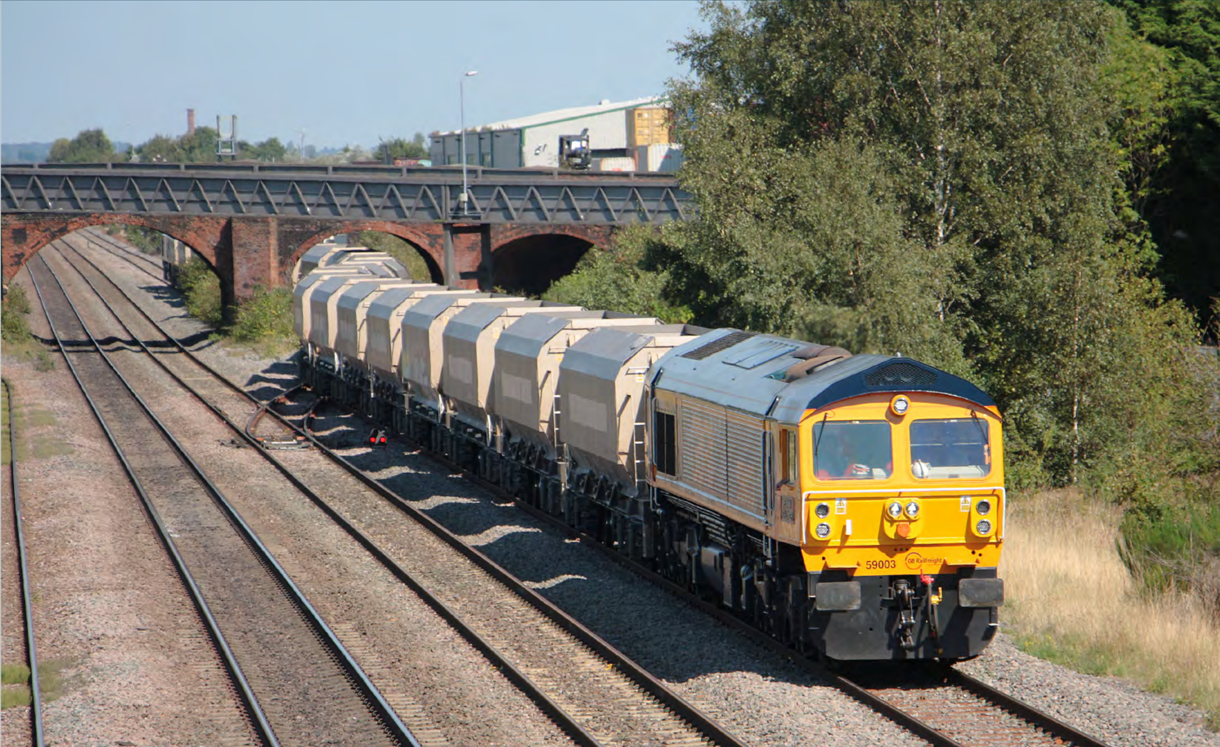
Class 59 003 'Yeoman Highlander' works the 6M83 Tinsley Yard - Bardon Hill Quarry empty stone hoppers, with 66751 dead on rear, through Burton on August 30th.