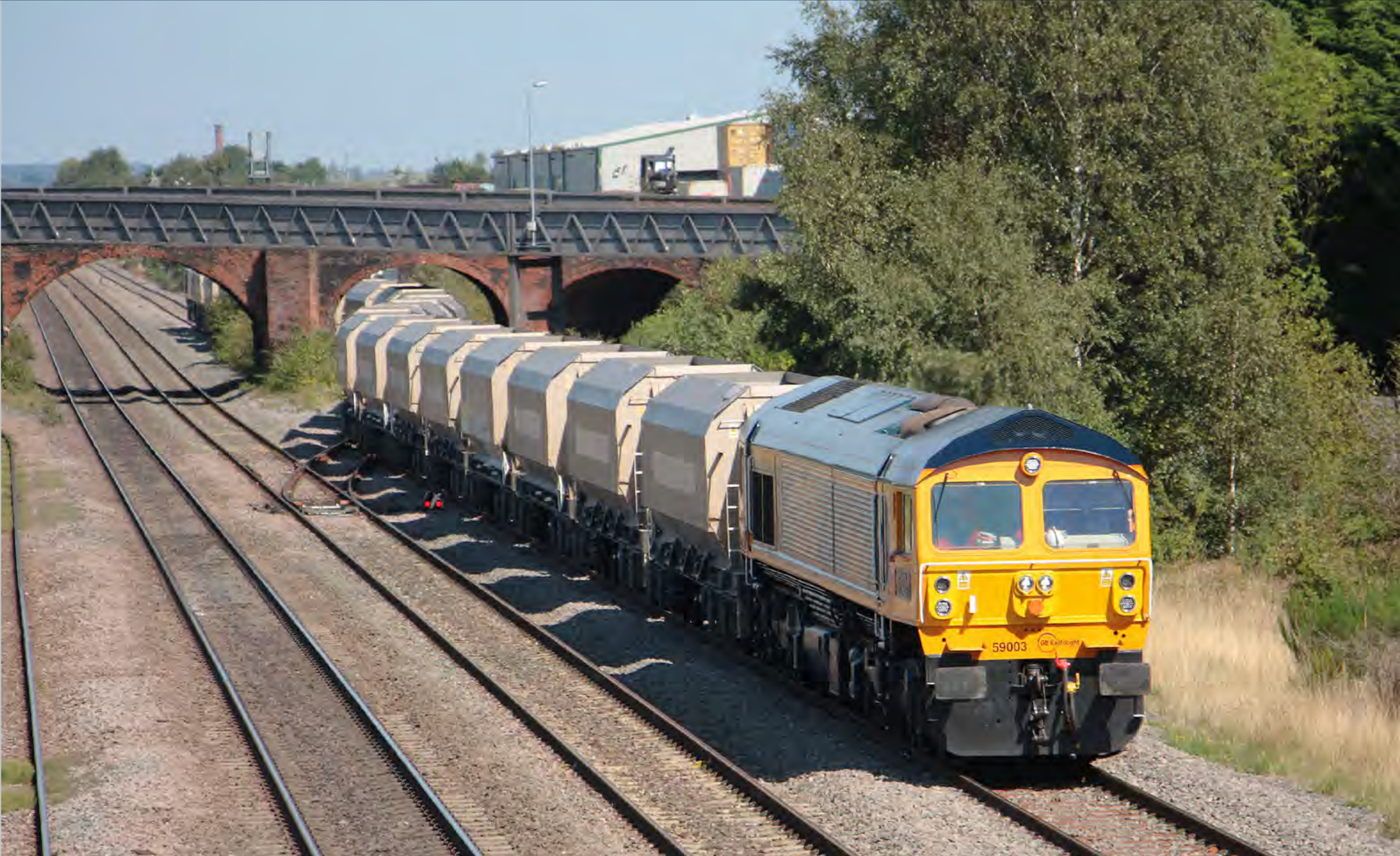
Class 59 003 'Yeoman Highlander' works the 6M83 Tinsley Yard - Bardon Hill Quarry empty stone hoppers, with 66751 dead on rear, through Burton on August 30th.