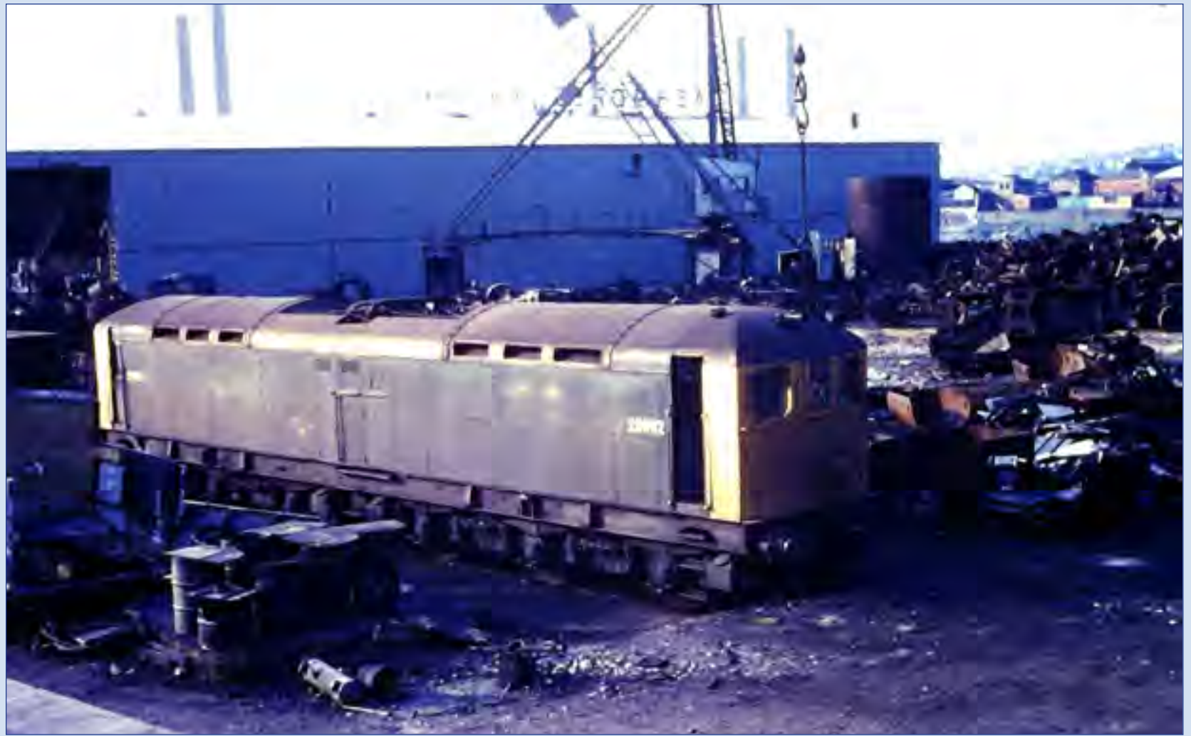
Another Photo at Cashmore's Scrapyard in Newport shows North British built Class 22 loco No. D6306 about to be cut up.

The photo below shows a British Rail Class 70, a class of three 3rd rail Co-Co electric locomotives. Built in 1945 and seen here in the scrap yard of Cashmore's at Newport.