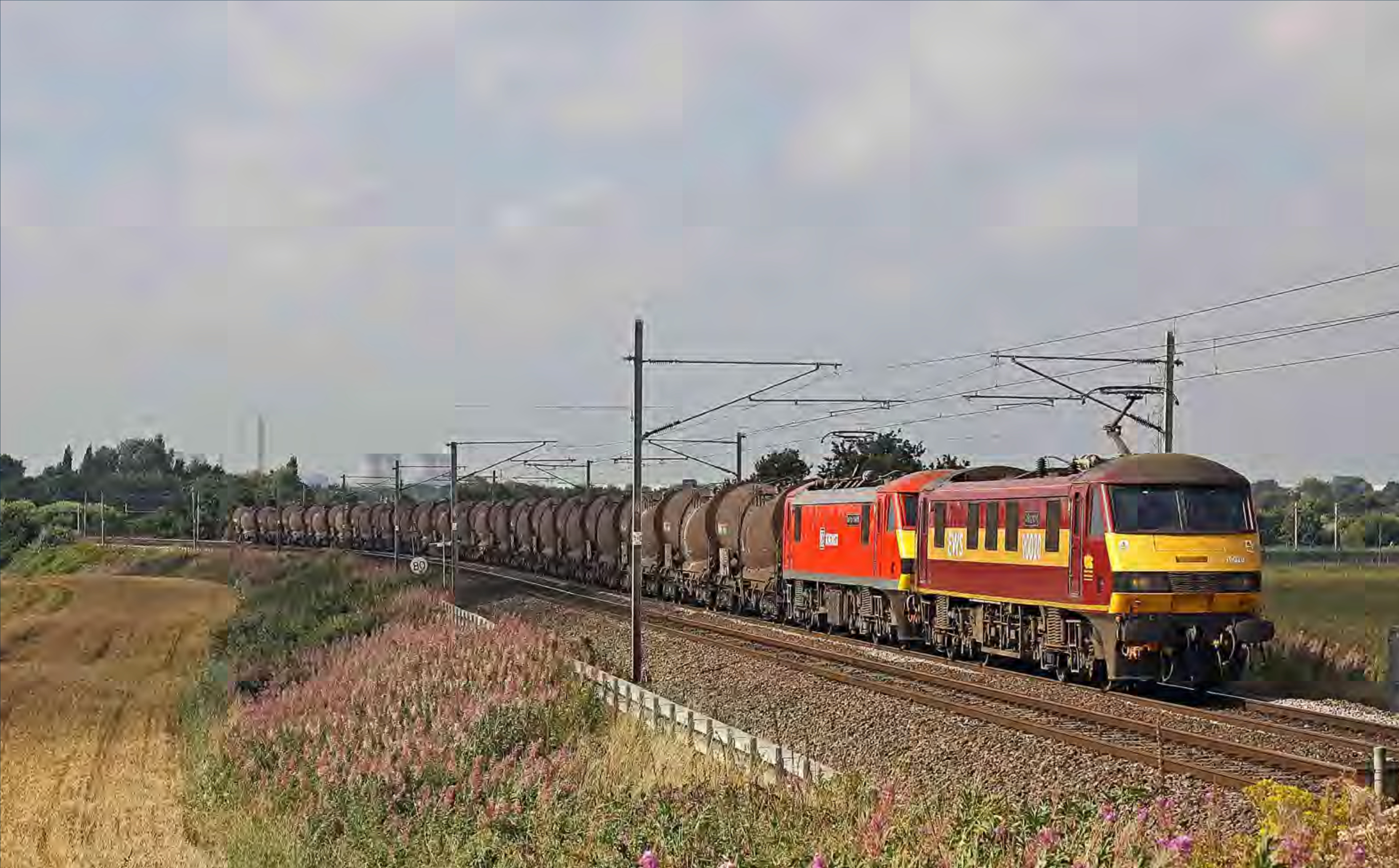
▶ Class 90 020 and 90 018 head past Red Bank, Warrington on August 17th working the 6S94 02:32 WO Dollands Moor - Irvine china clay tanks.