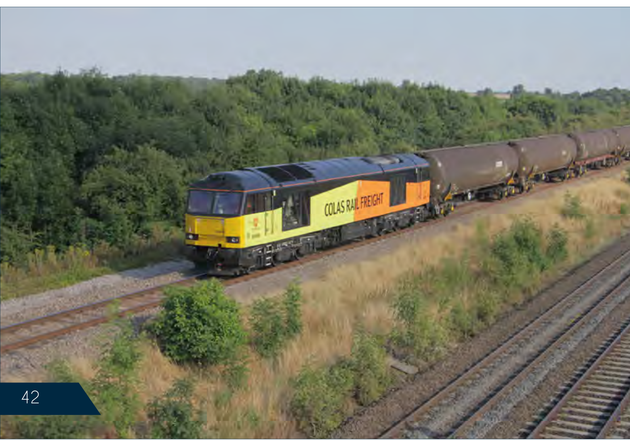
▶ On August 11th, Class 60 047 approaches Pleasington with an empty oil train from Colas Ribble Rail Preston, heading to Lindsey oil refinery.