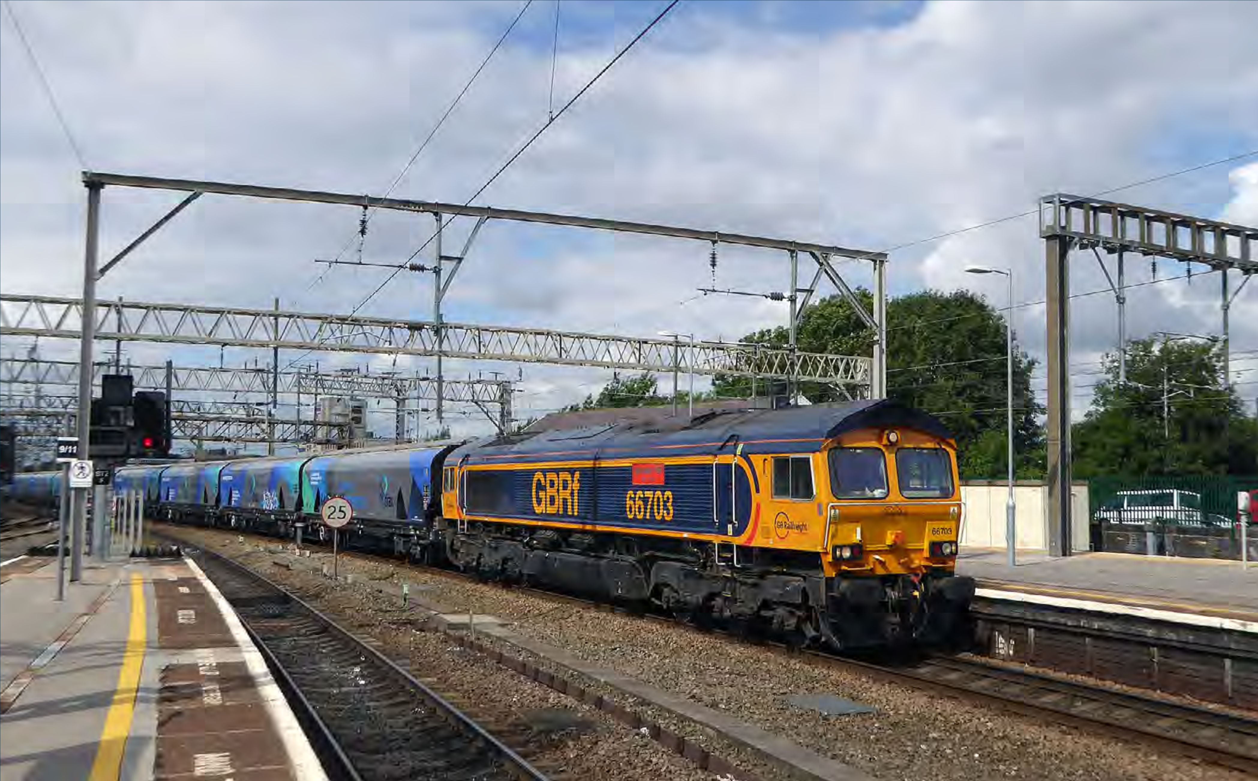
Class 66 703 passes through Stockport on August 10th with a Liverpool - Drax power station Biomass. Michael Lynam