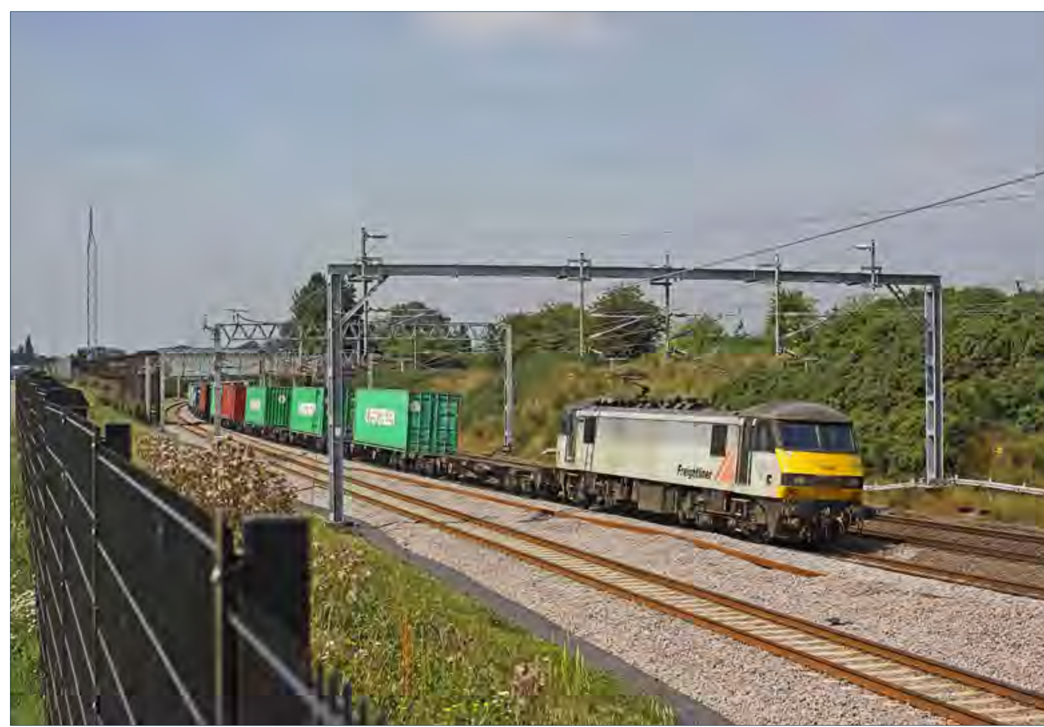
▶ Class 66 545 works the 6G07 Barnetby Rec - York Yard South through Scunthorpe on August 7th.