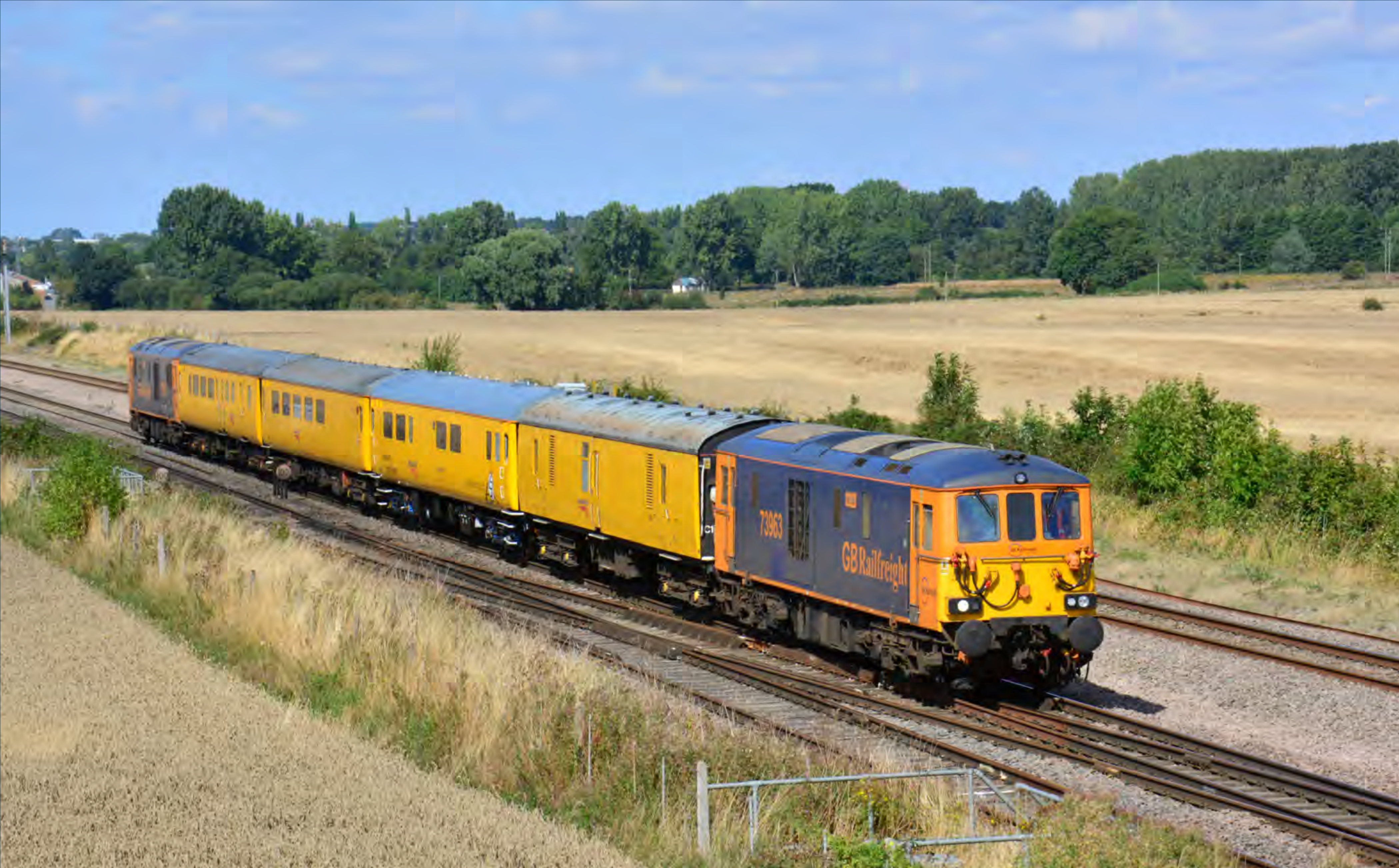
With Class 73963 on the front and 73961 bringing up the rear, the Derby to Eastleigh Arlington test train is pictured at Harrowden Junction on August 29th in some lovely summer sunshine. Geoff Barton