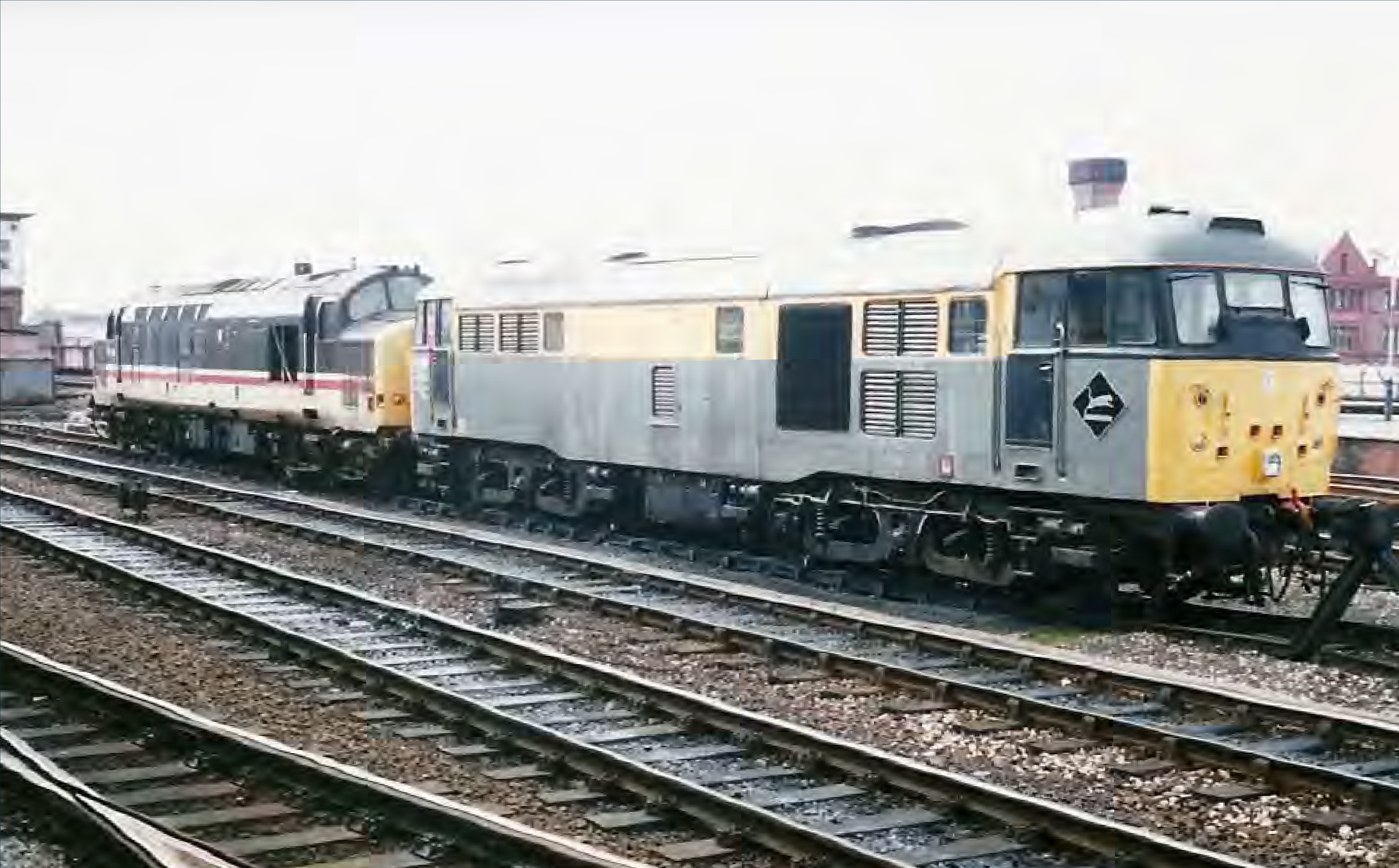
▶ Class 31 125 and 37 426 are seen stabled at Manchester Victoria on April 6th 1992. Michael Lynam