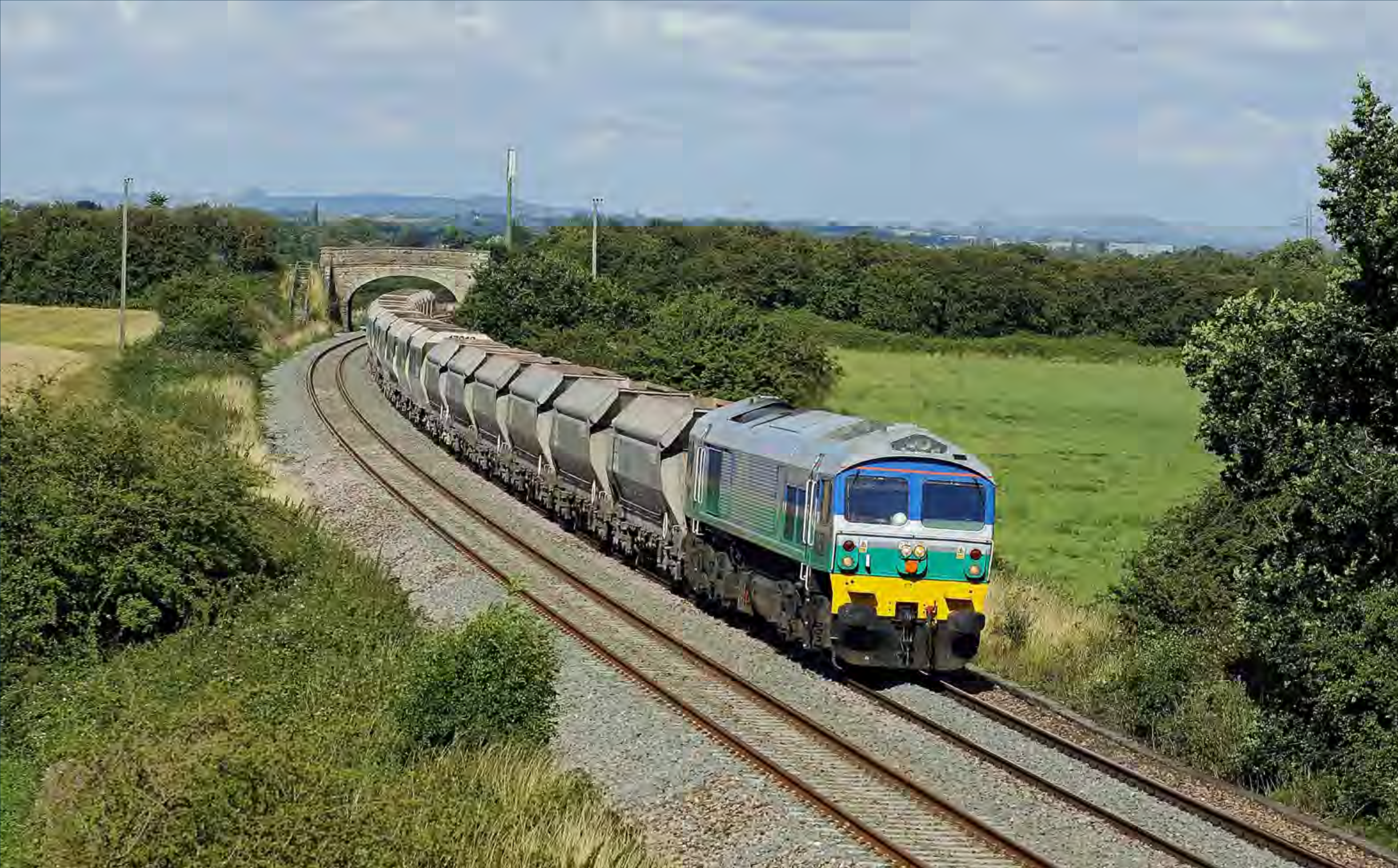
▶ Class 59 002 with the 6V18 11:19 Allington ARC Siding - Whatley Quarry approaches Frome on August 5th.