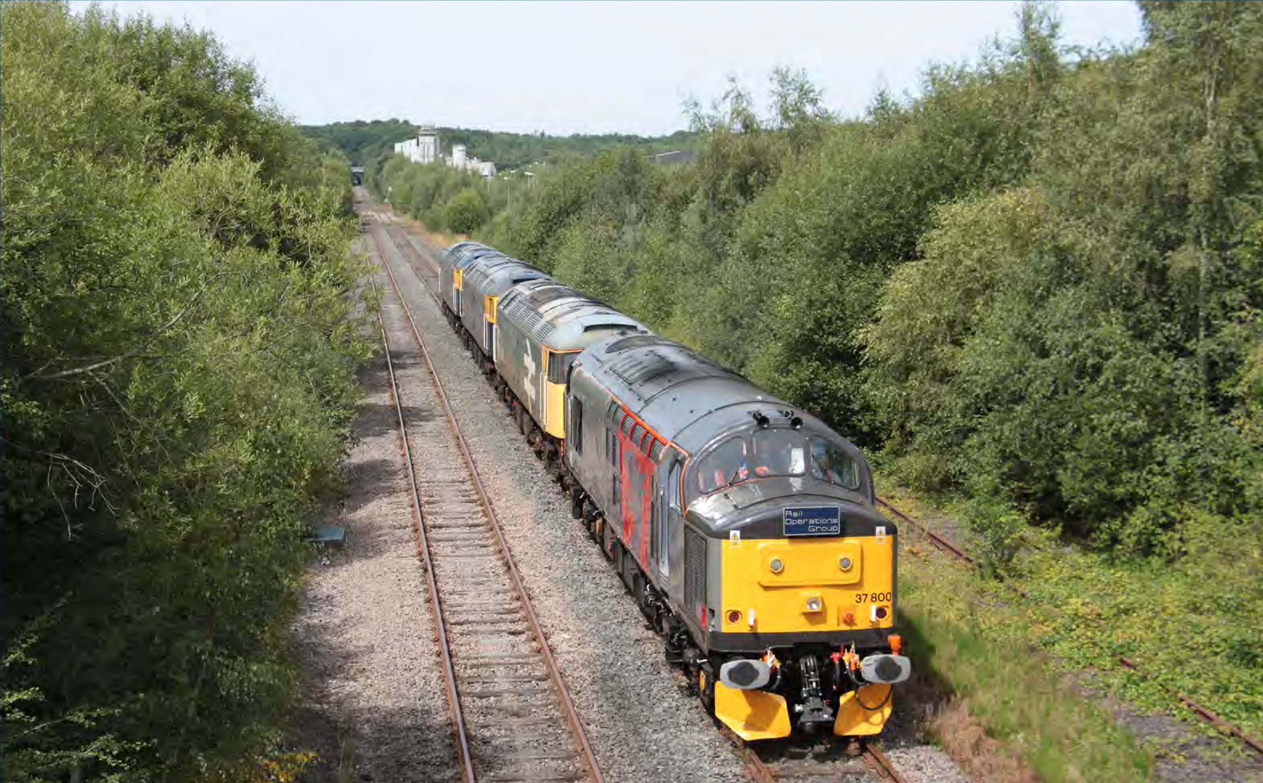
▶ Class 37 800 passes Moira on August 5th hauling 47 847, 47 843 and 47 848 from Burton to Leicester.