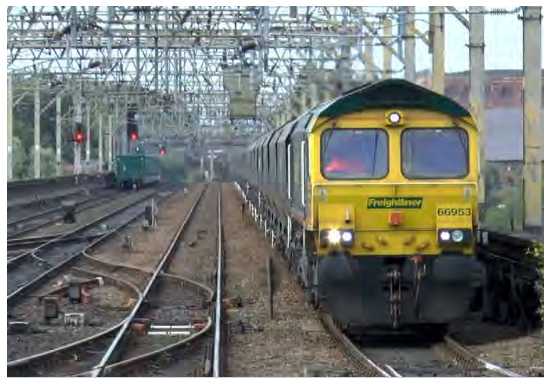
▶ On August 10th, Class 66 953 heads over Stockport Viaduct working a Ferrybridge to Fiddlers Ferry coal.