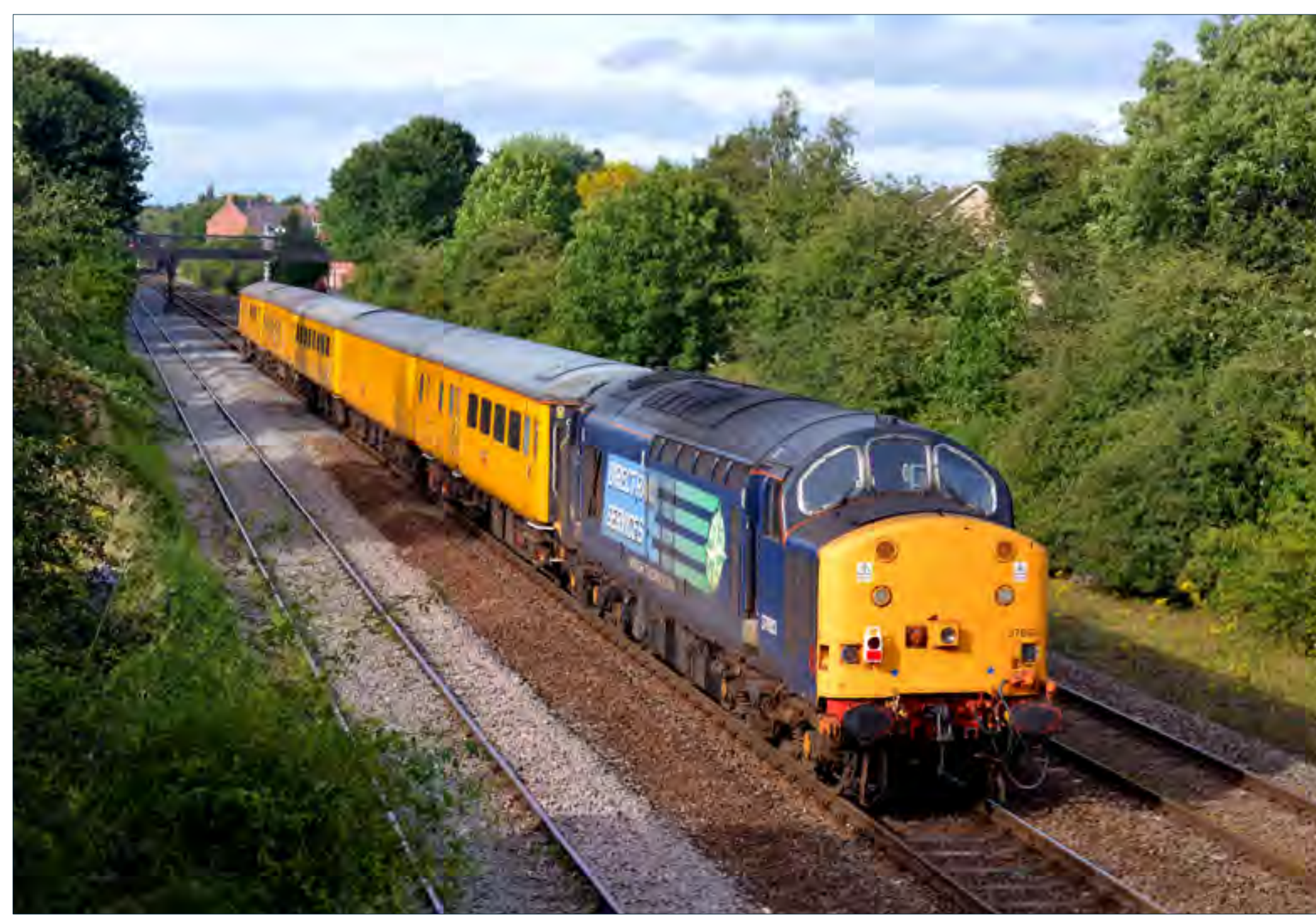
On August 21st, Class 37 057 is pictured at Bayston Hill with 5Z01 15:37 Cardiff Canton Sidings - Crewe (L&NWR) Site.