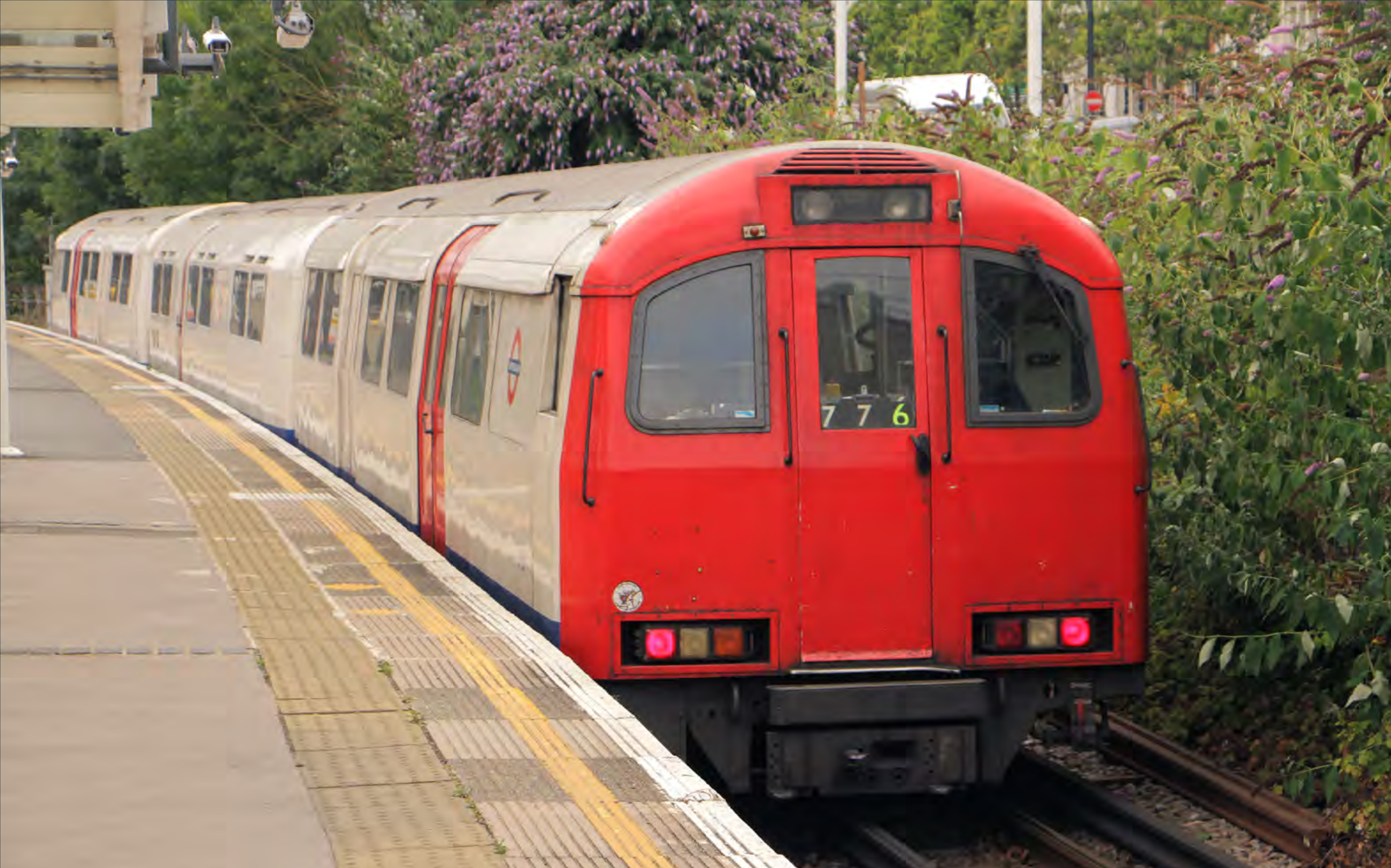
▶ 'London Underground Track Recording Train (Nos. L132, TRC666 and L133) is seen departing Kensington Olympia on August 10th.