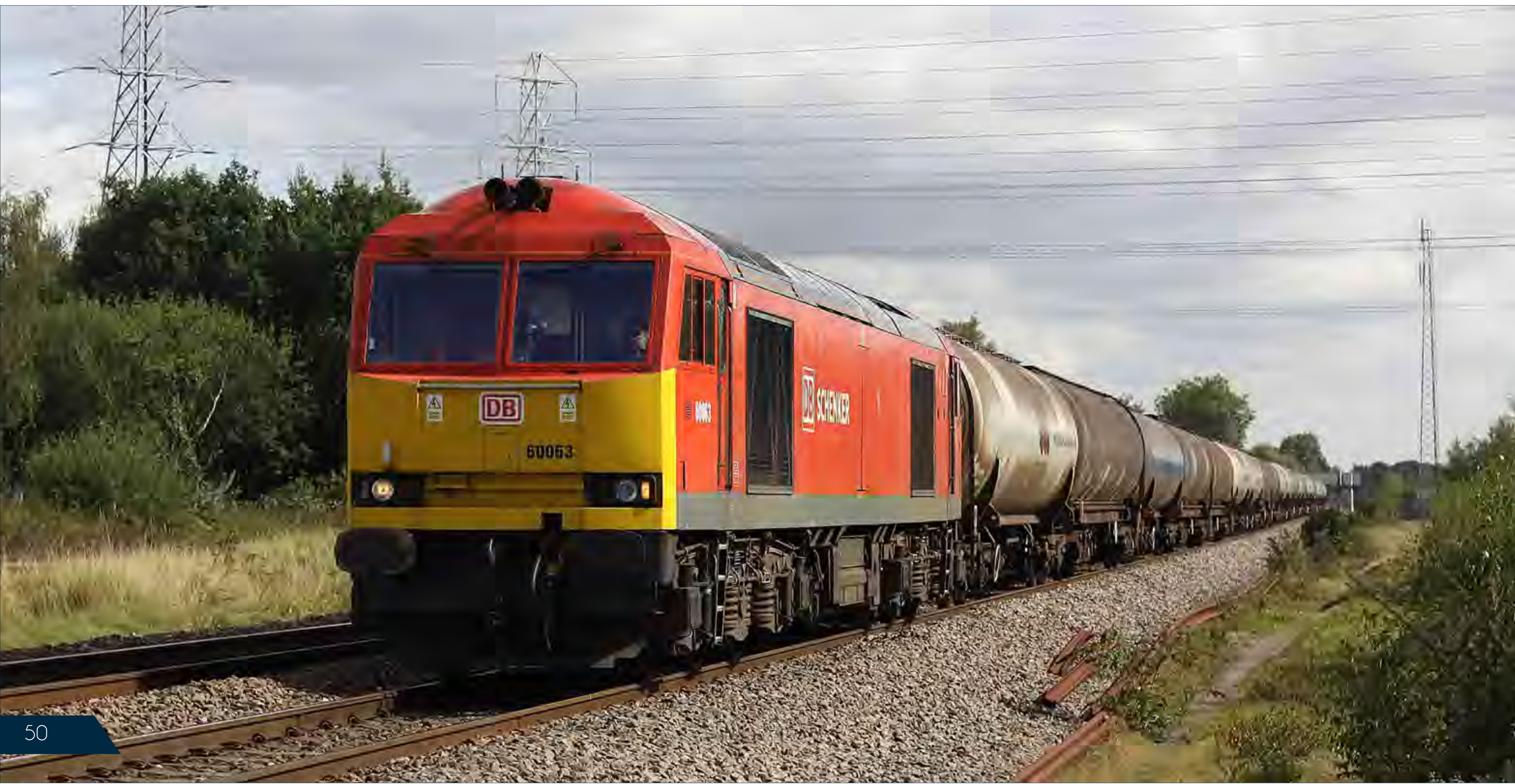
◀ Class 60 063 with the 6M57 07:15 Lindsey - Kingsbury bogie tanks, passes North Stafford Jct. on September 1st. Nick Clemson

We want the local community to know that our approach is different and supports our motto of 'helping to build a greener, greater London'. If permission is granted, we will be employing people to work on the site and introducing an apprenticeship scheme. We plan to recruit local people wherever possible."