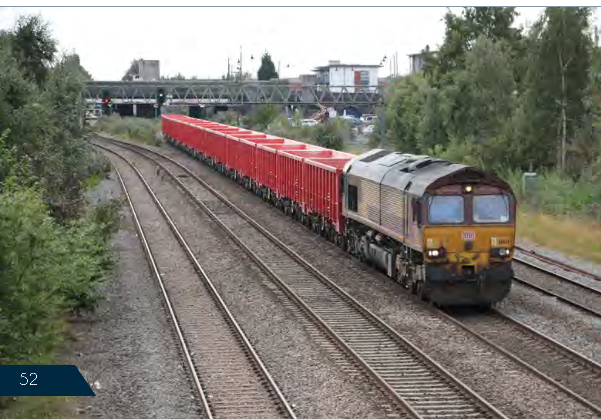
▶ On August 11th, Class 66 037 working the 4M11 Washwood Heath - Peak Forest empty limestone wagons, heads through Wychnor Junction. Stuart Hillis