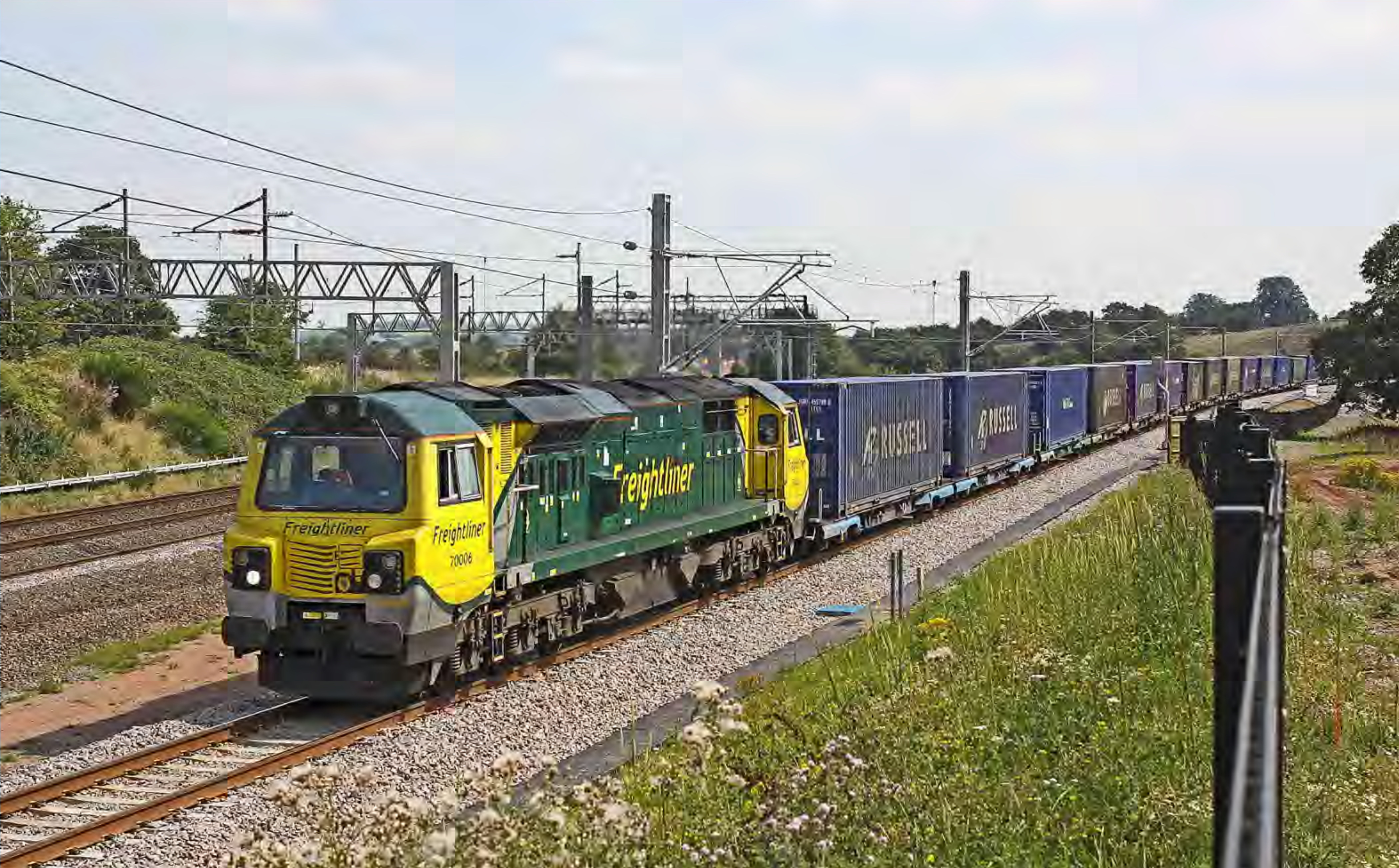
▶ Class 70 006 comes off the new deviation near Heamies Farm with 4Z44 12:13 Daventry International - Coatbridge FLT on August 15th. Nick Clemson