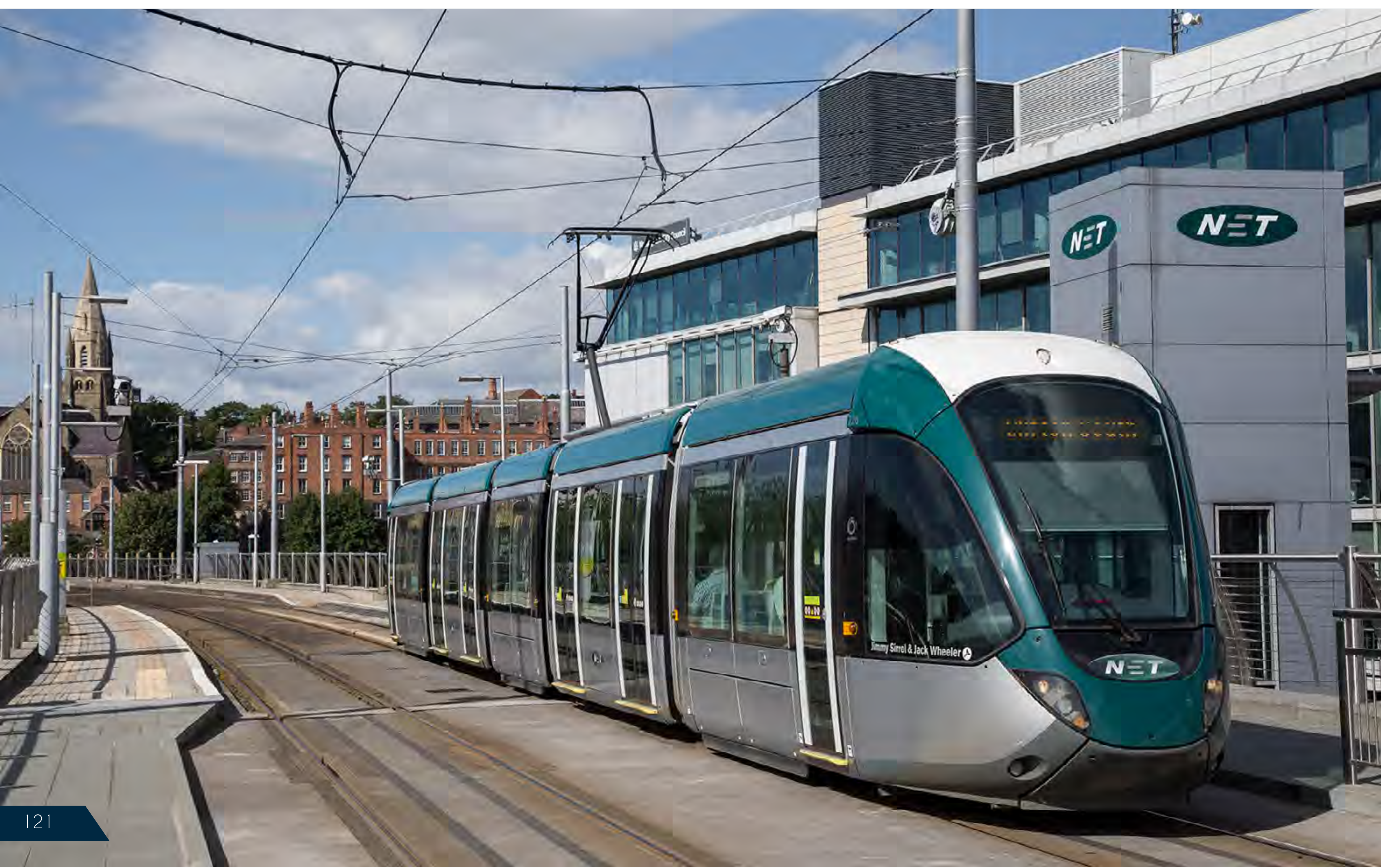
▶ Bombardier Incentro AT6/5 tram No. 206, in eye catching eon livery, approaches Nottingham station working a service to Toton Lane on August 8th. Richard Hargreaves