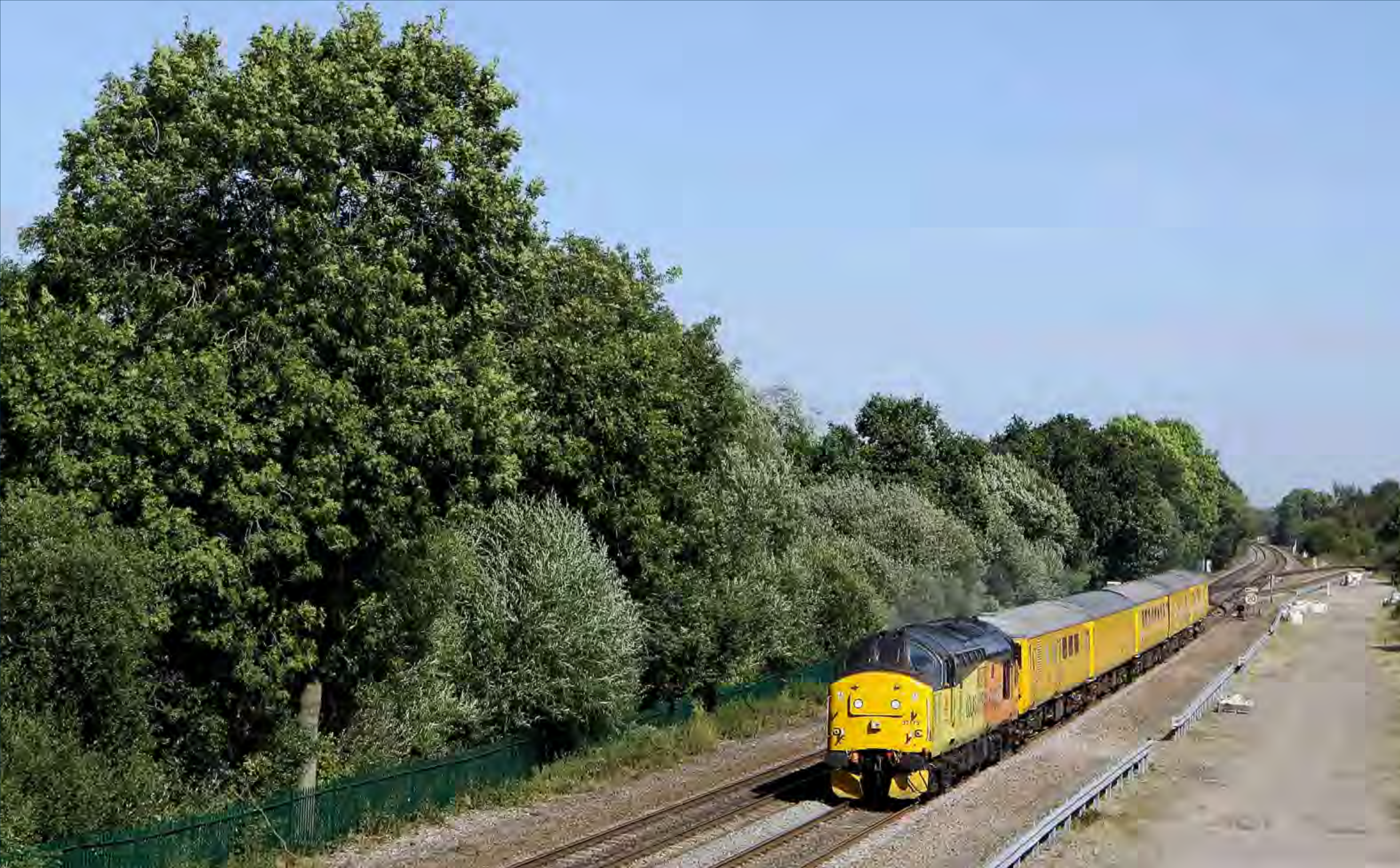
Class 37 175 heads through Stenson Junction on September 1st with a Derby RTC - Tyseley test train. Nick Clemson