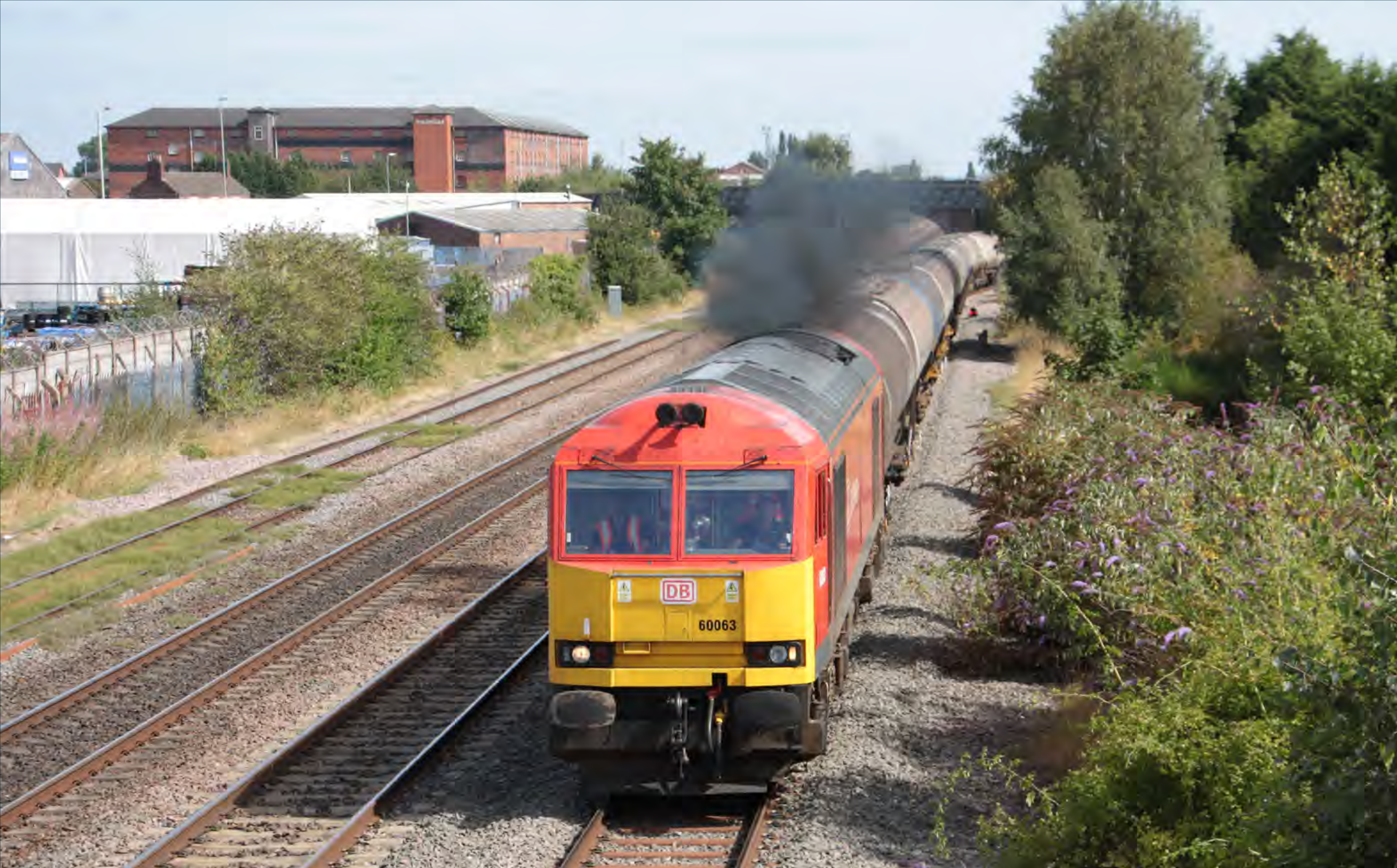
▶ Class 60 063 working the 6M57 Lindsey - Kingsbury loaded oils, powers away from Burton on August 16th. Stuart Hillis