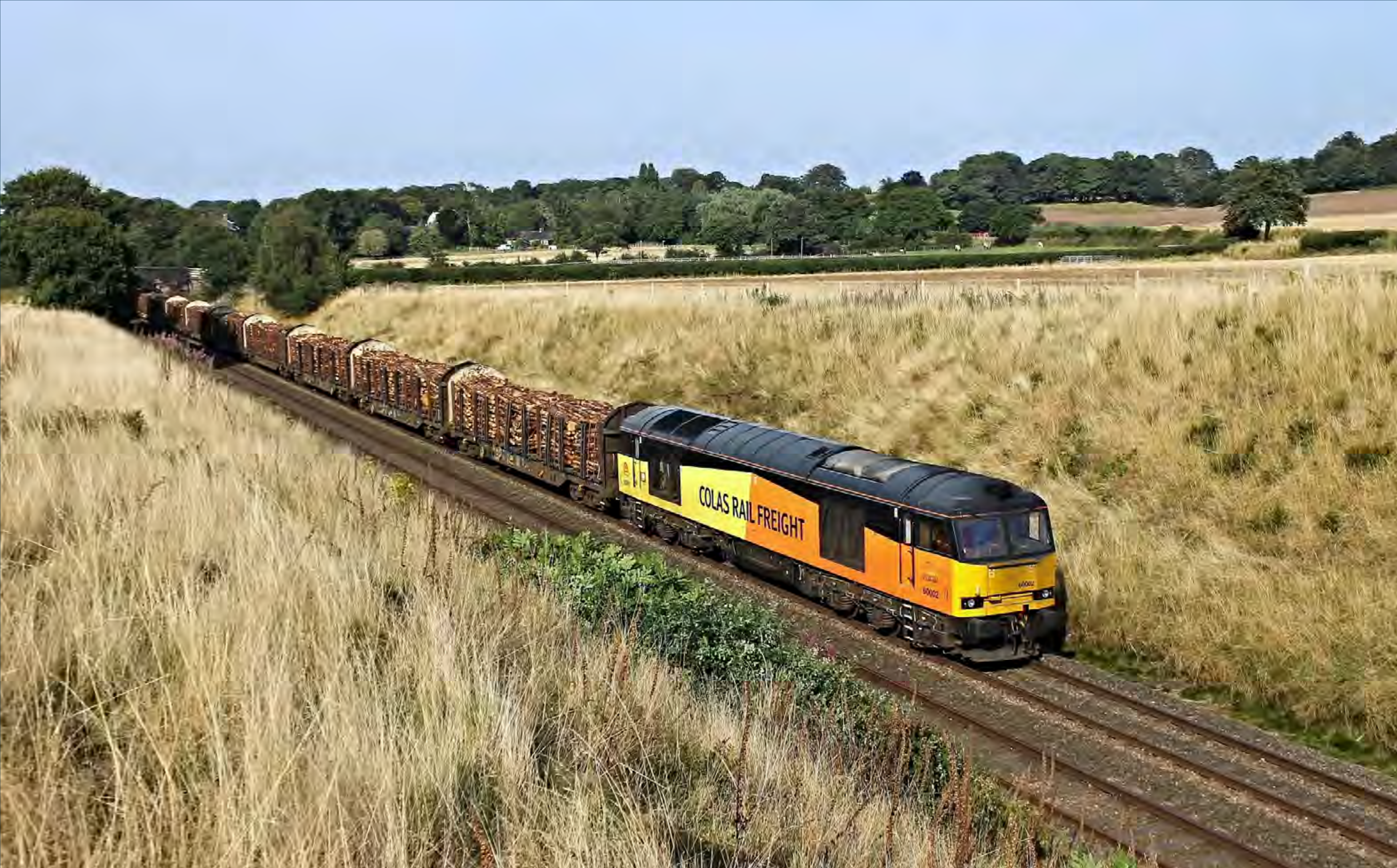
▶ Class 60 002, the former 'High Peak' rolls through Daresbury with the 6J37 Carlisle - Chirk timber on August 15th.