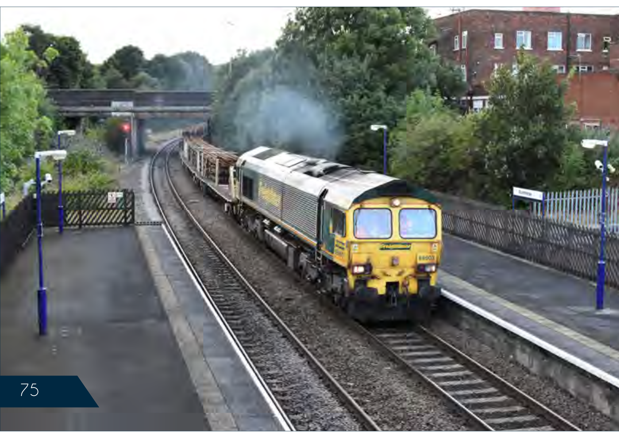
Class 66 595 and 66 047 are pictured at Malvern Wells during track re-laying works. Neil Pugh