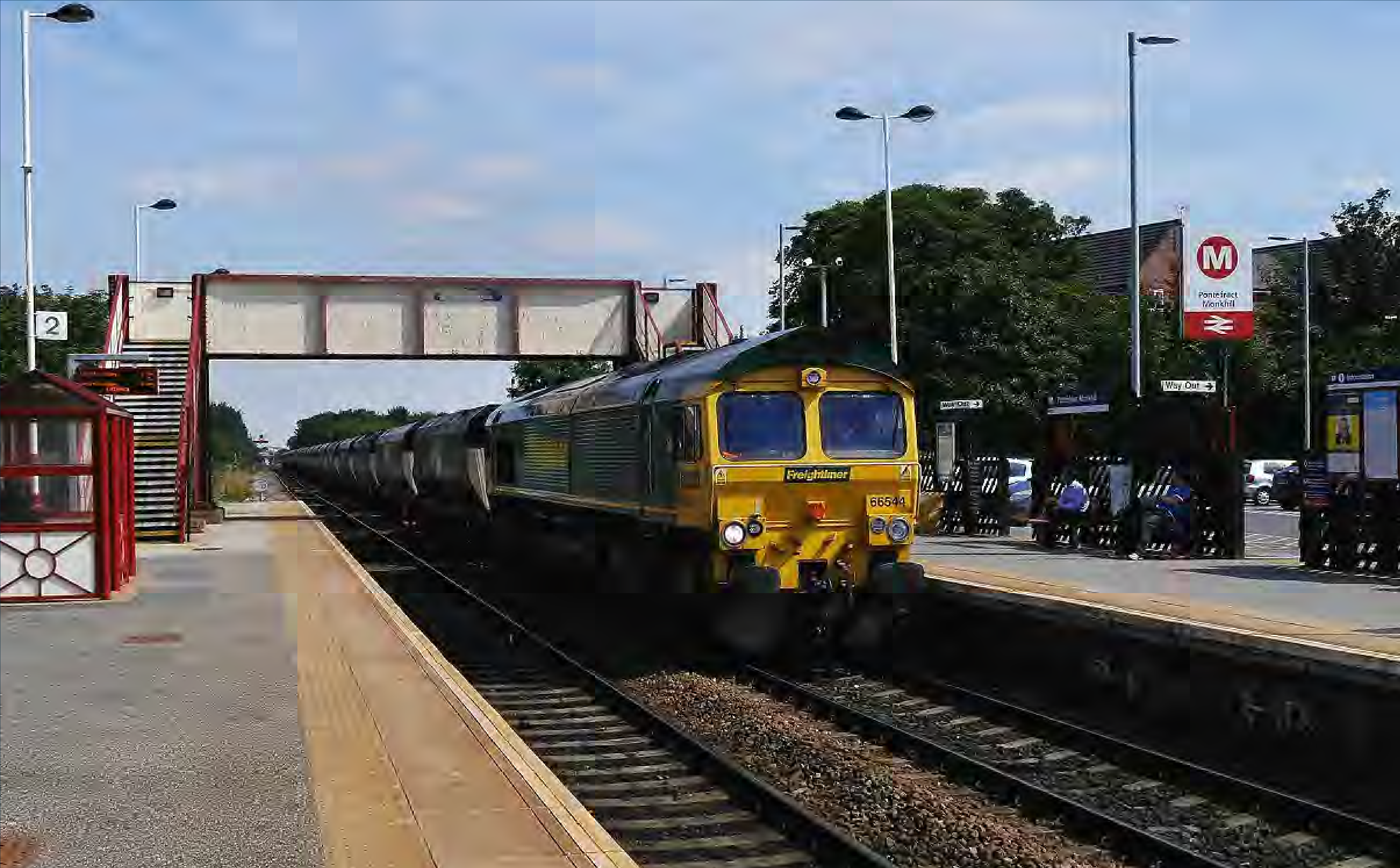
▶ Class 66 544 working the 12:58 Ferrybridge - Fiddler's Ferry loaded coal, heads through Pontefract Monkhill on August 16th.