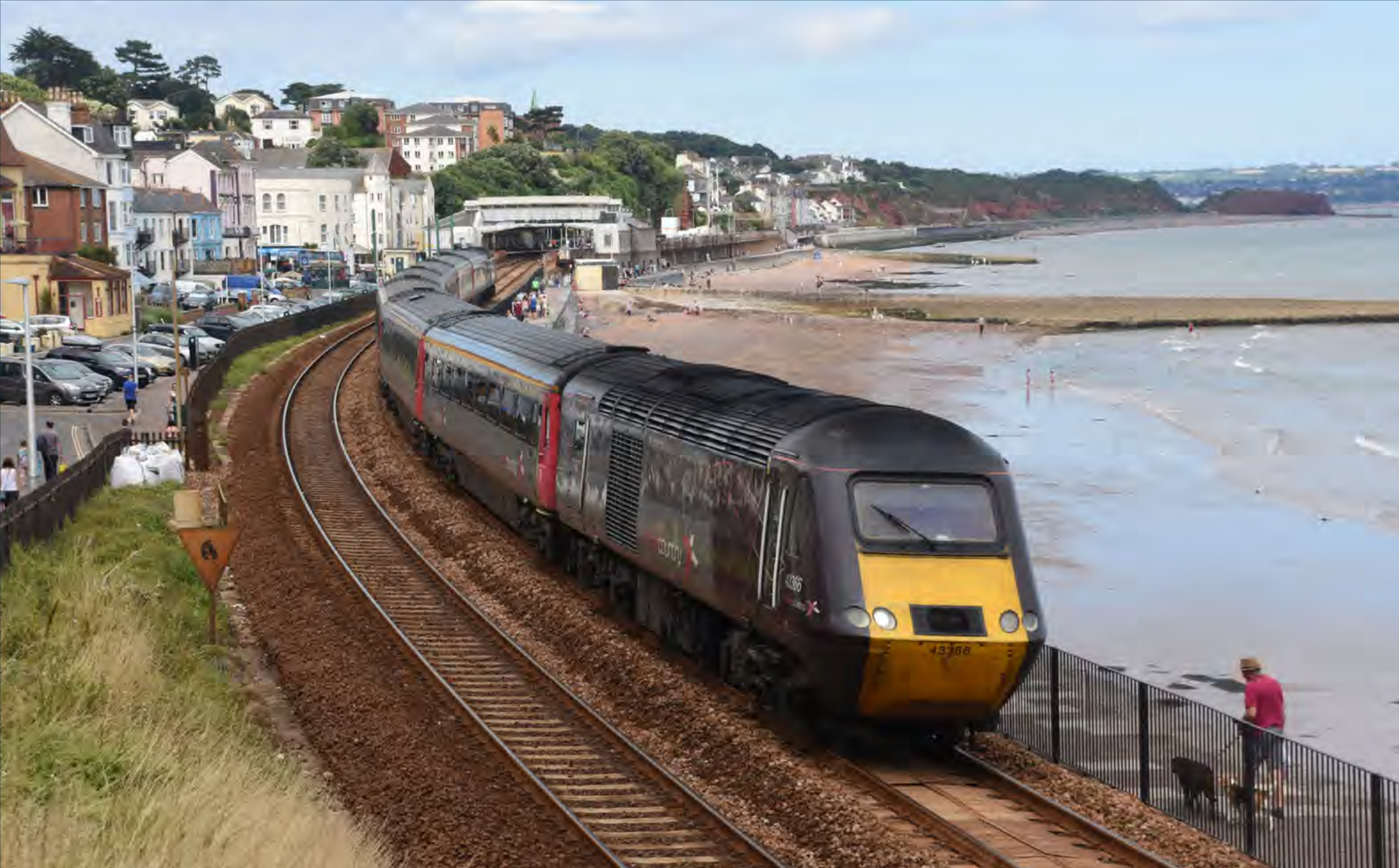
On August 6th, power cars Nos. 43366 and 43207, having waited for the sun to go in, pass by Dawlish running 18 late working the 1V54 Dundee - Newquay.