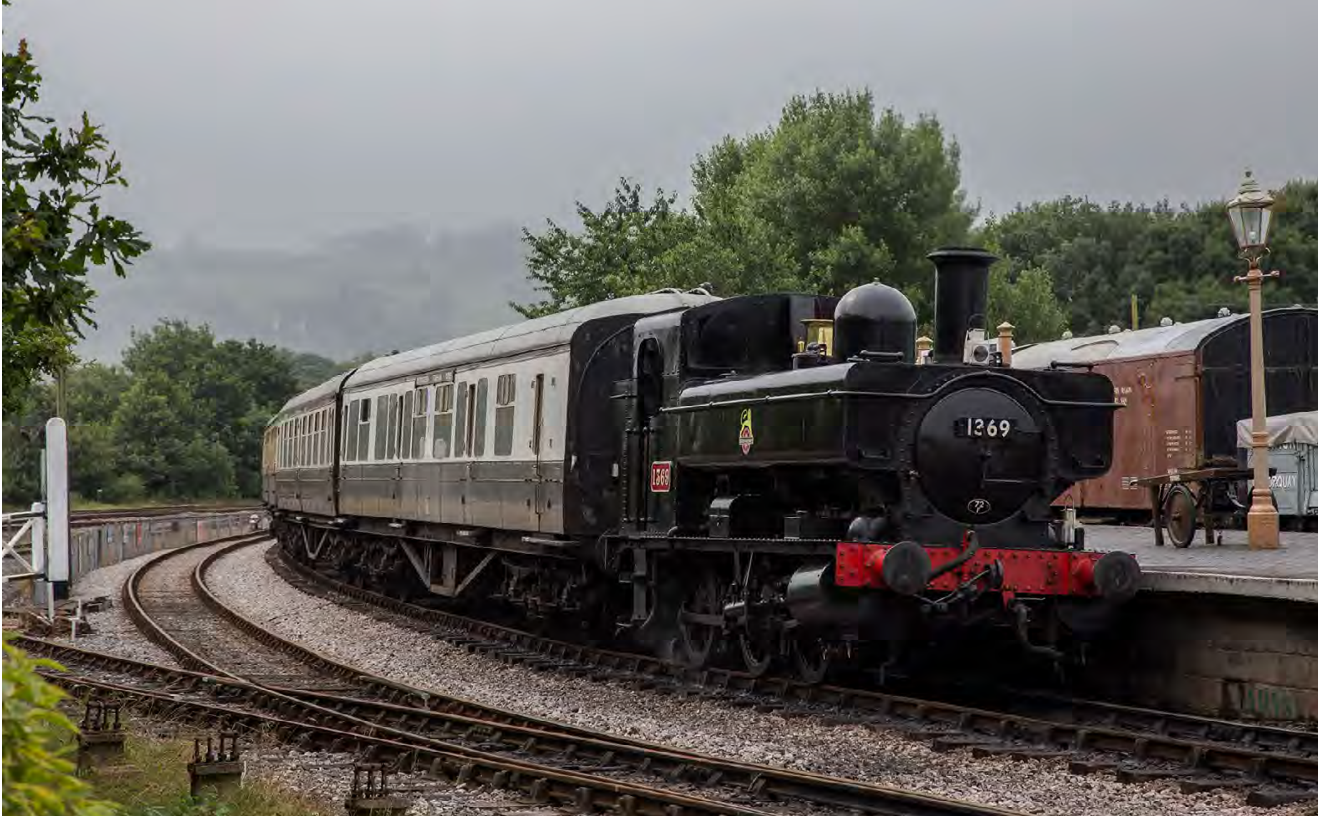
▶ GWR 0-6-0PT No. 1369 stands at Totnes on August 2nd working a service to Buckfastleigh.