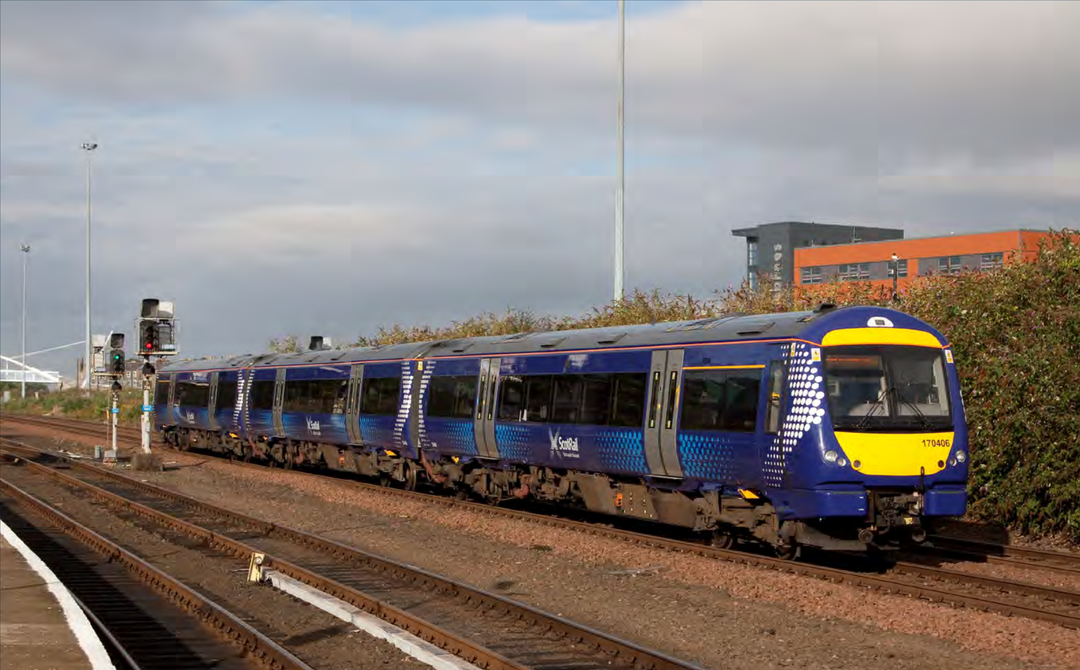
▶ On August 20th, Class 170 406 approaches Dundee with an Edinburgh service.