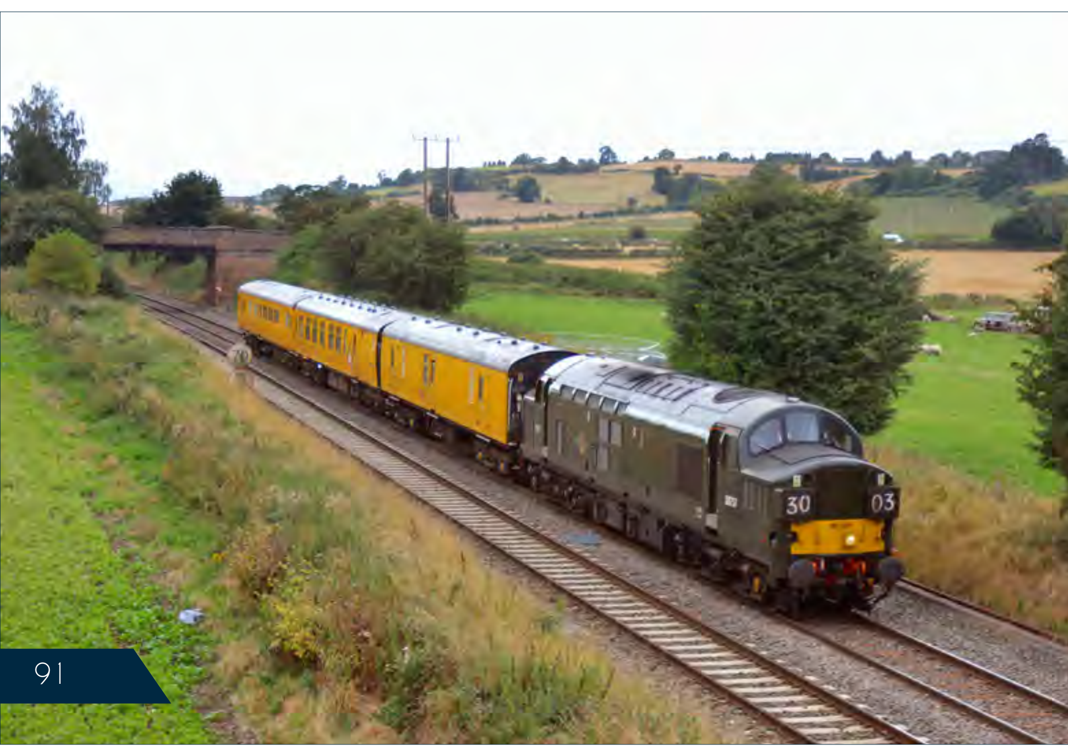
Class 37 603 passes Kempsey Shrewsbury with the 3Z01 15:22 Pengam Sidings - Coleham on August 11th.