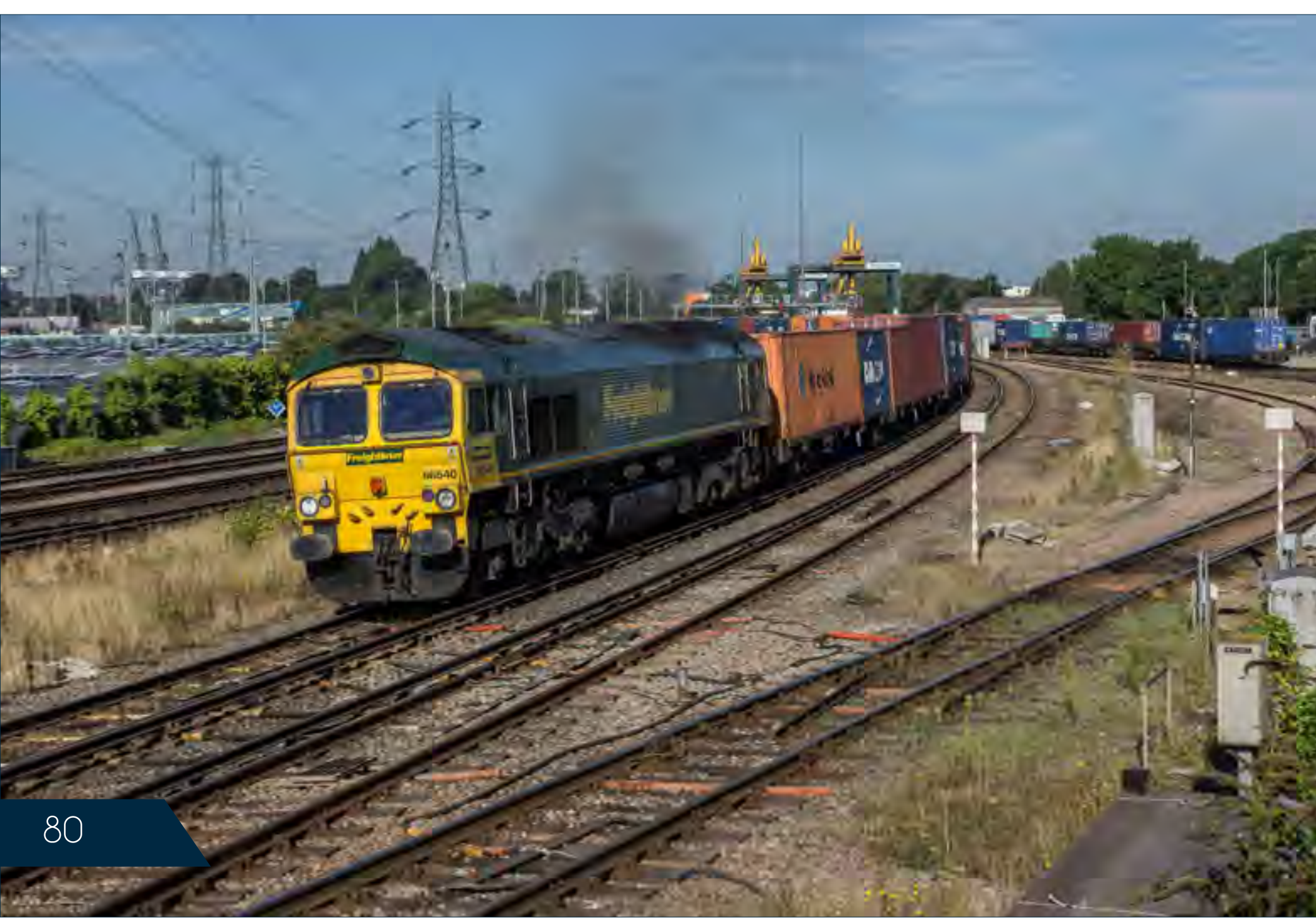
▶ On August 29th, Class 66 506, 66 525 and 66 550 working from Crewe Basford Hall to Leeds Balm Road, head out of Stalybridge. Brian Hewertson