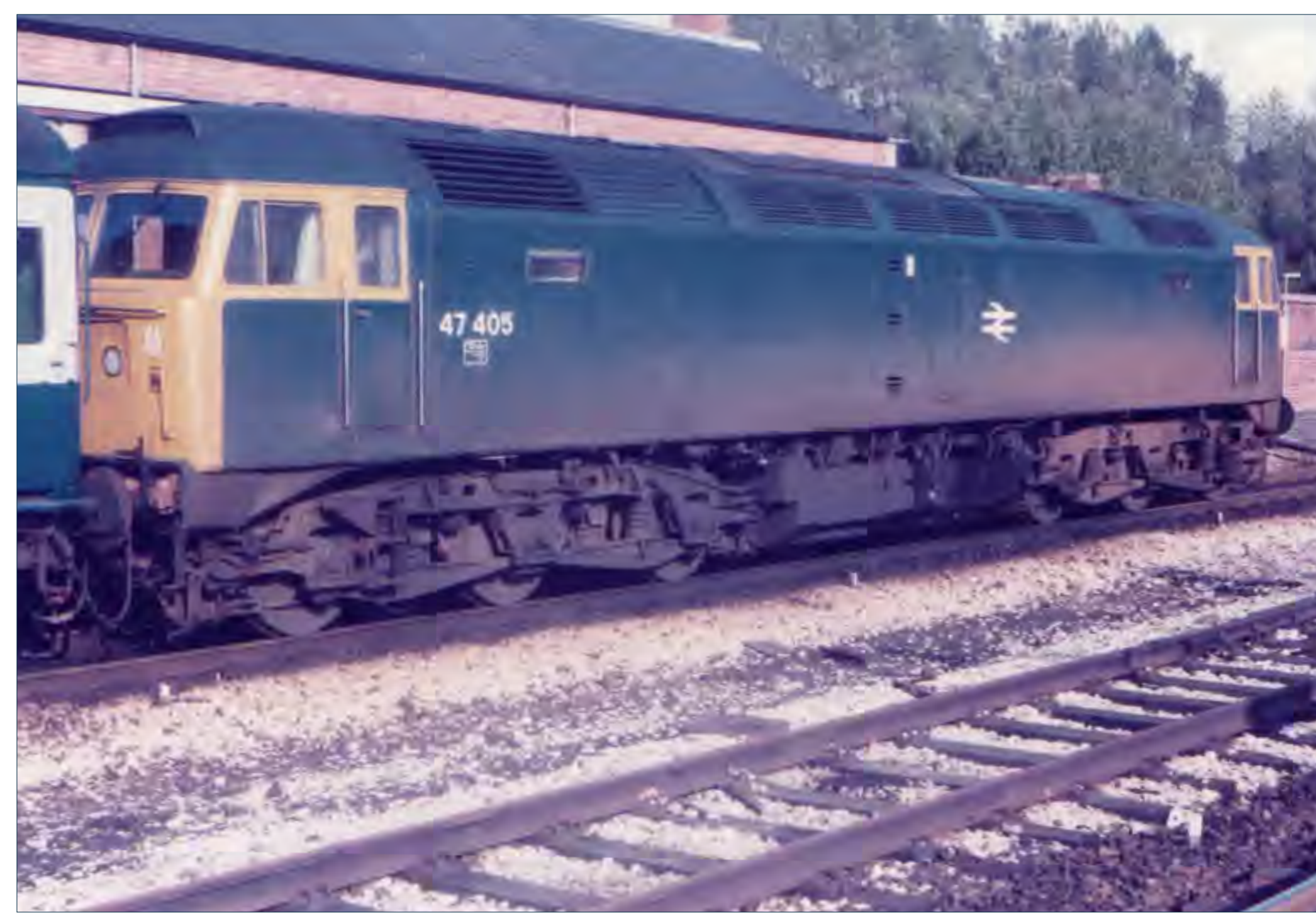
▶ In days of proper trains on Trans Pennine services, Class 47 405 calls at Stalybridge on October 22nd 1981 working a Newcastle bound service.