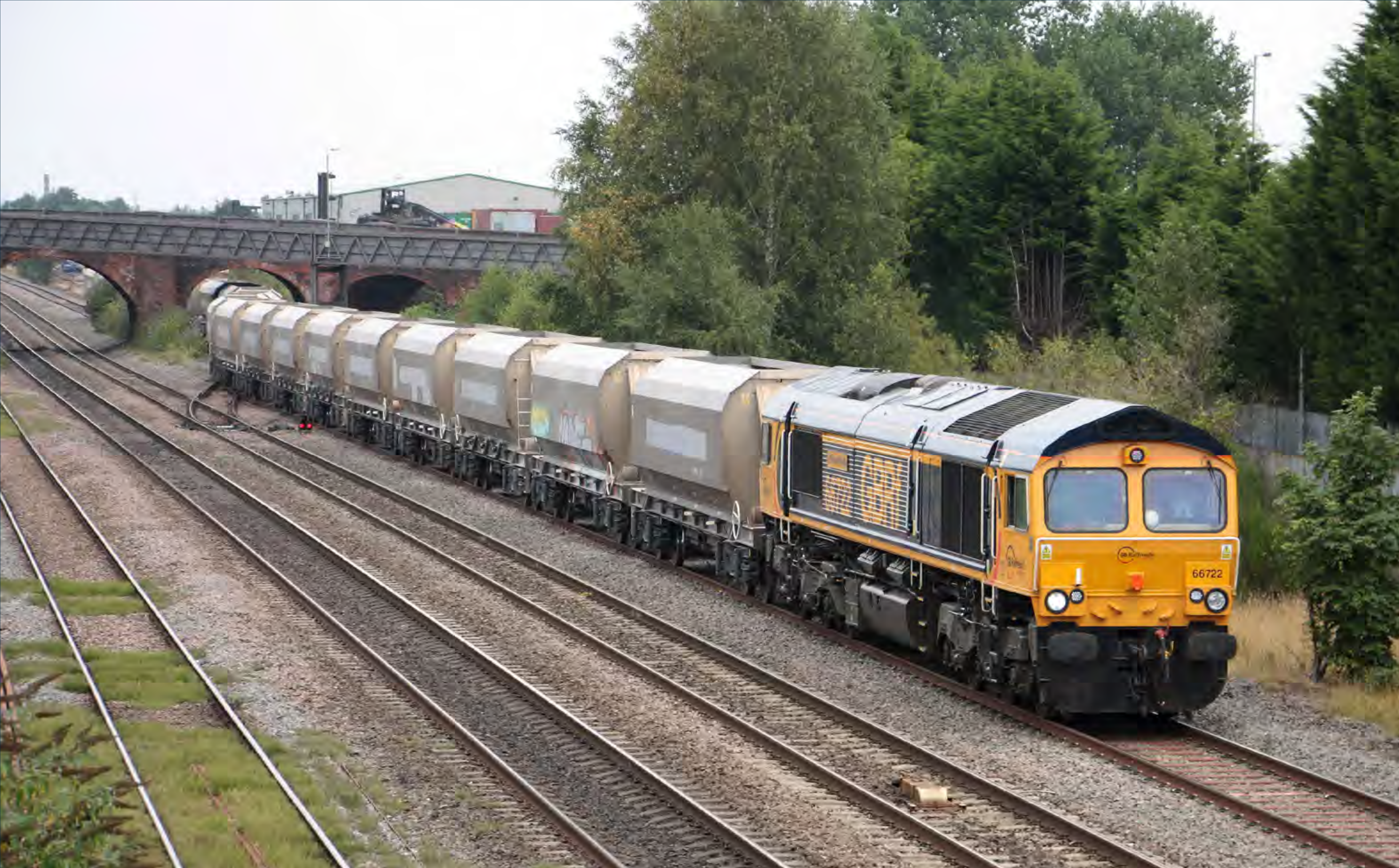
▶ Class 66 722 'Sir Edward Watkin' works 6M83 Tinsley - Bardon Hill empty hopper wagons at Burton on August 18th.