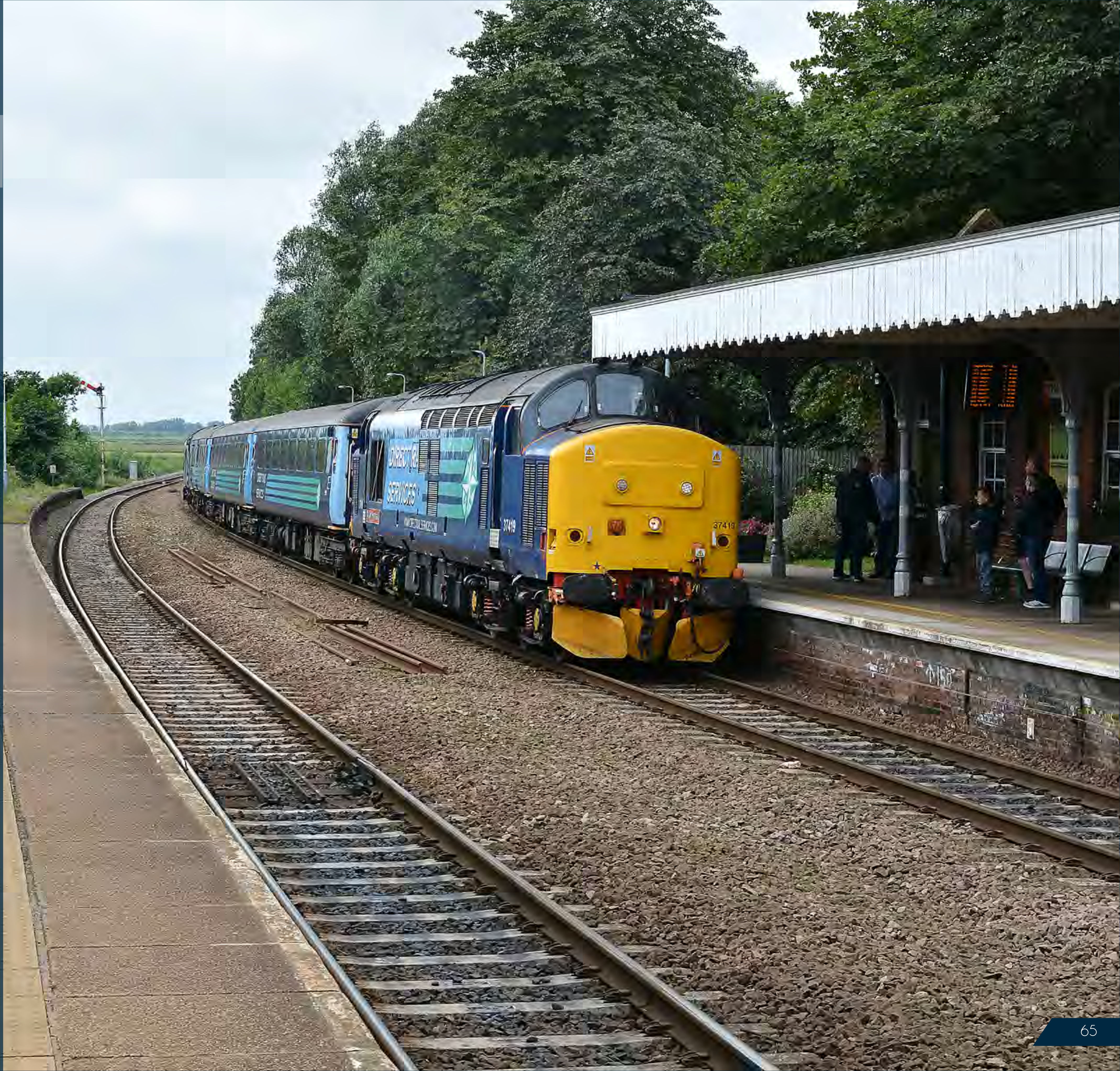
Class 37 419 pulls into Reedham station (with 37 422 on the rear) working a Lowestoft service on August 11th. Charlie Robbins