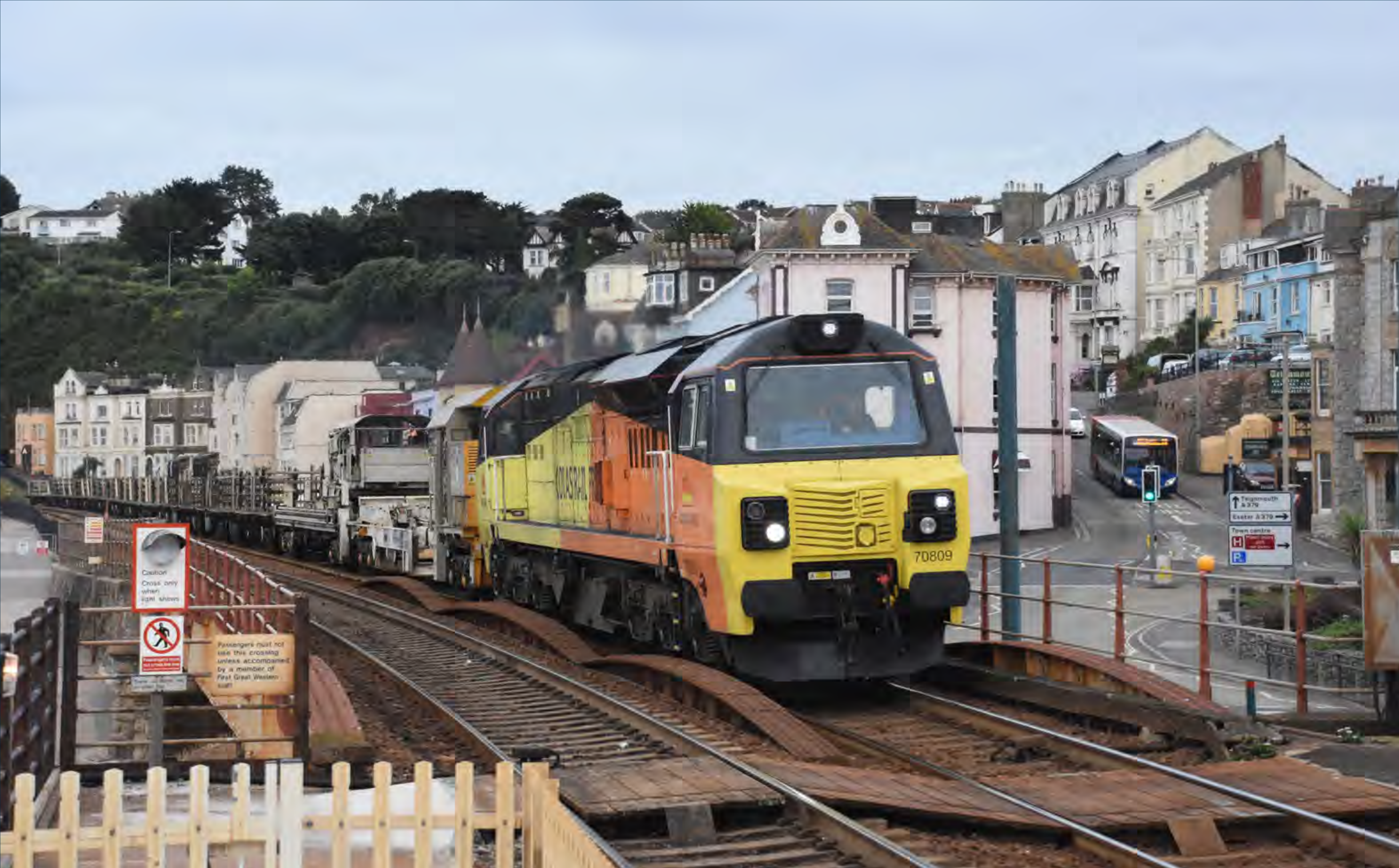
▶ Class 70 809 passes through Dawlish on July 26th working the 6C97 Liskeard - Eastleigh empty Rail Delivery Train.