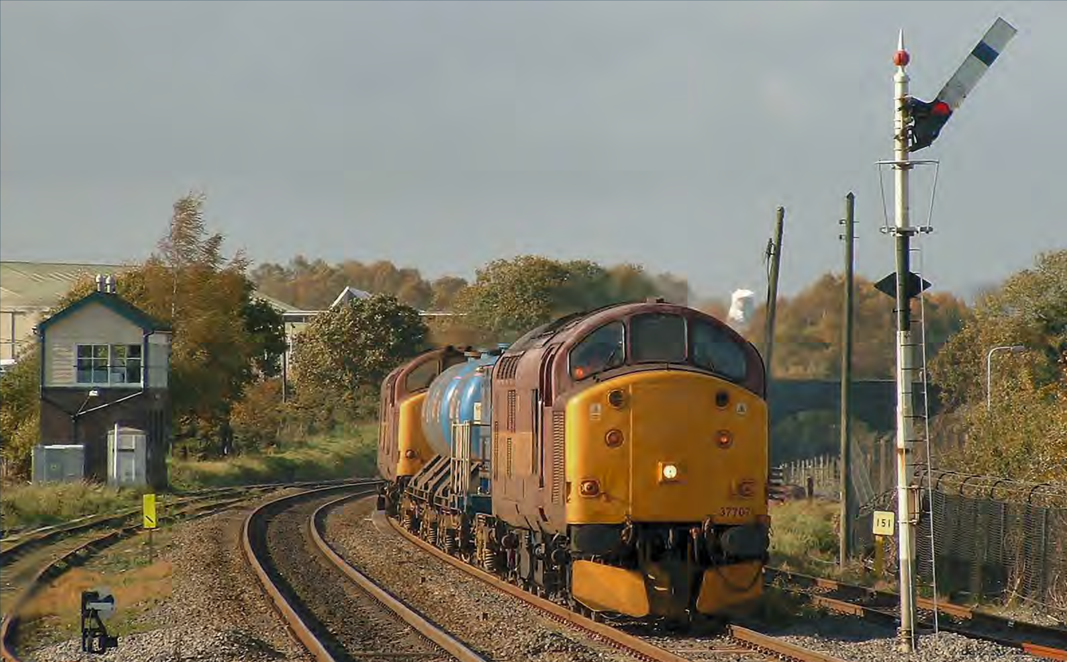
▶ Class 37 707 and 37 895 top'n'tail the 1Z96 11:48 Nantwich - Bescot RHTT working through Cosford on October 24th 2004. Carl Grocott