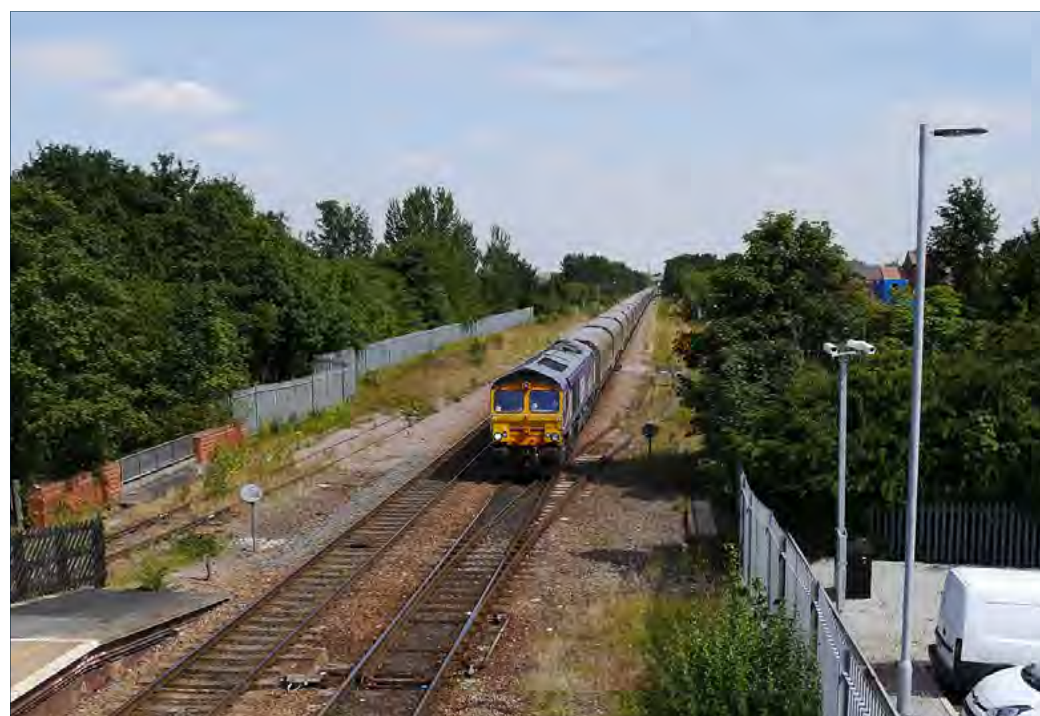
▶ Class 66 703, working a Liverpool Bulk Terminal - Drax Biomass, passes Winwick on August 8th. Alan Rigby