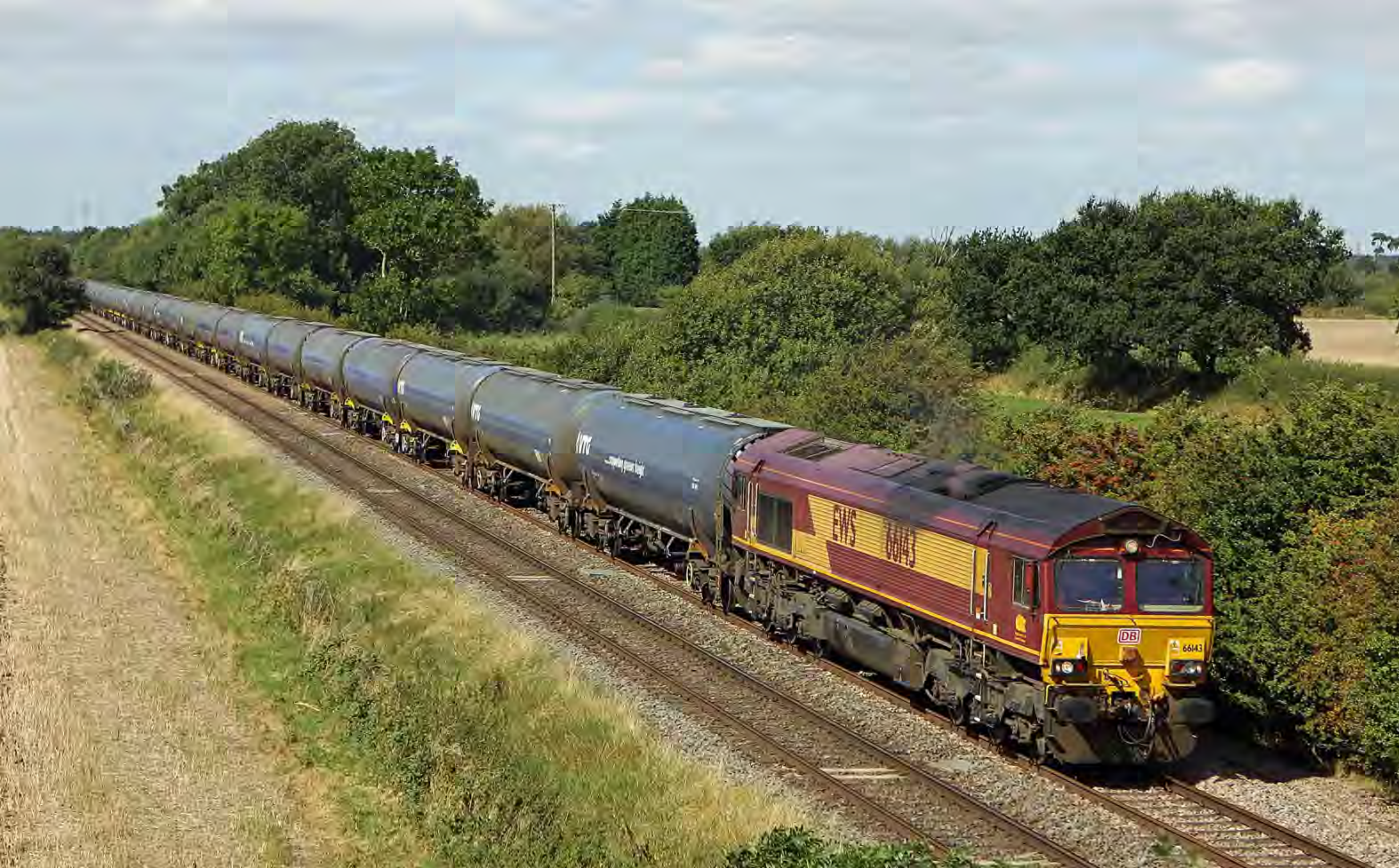
Class 66 143 passes Barrow-on-Trent with the 6E54 10:35 Kingsbury - Humber empty tanks on September 1st. Nick Clemson