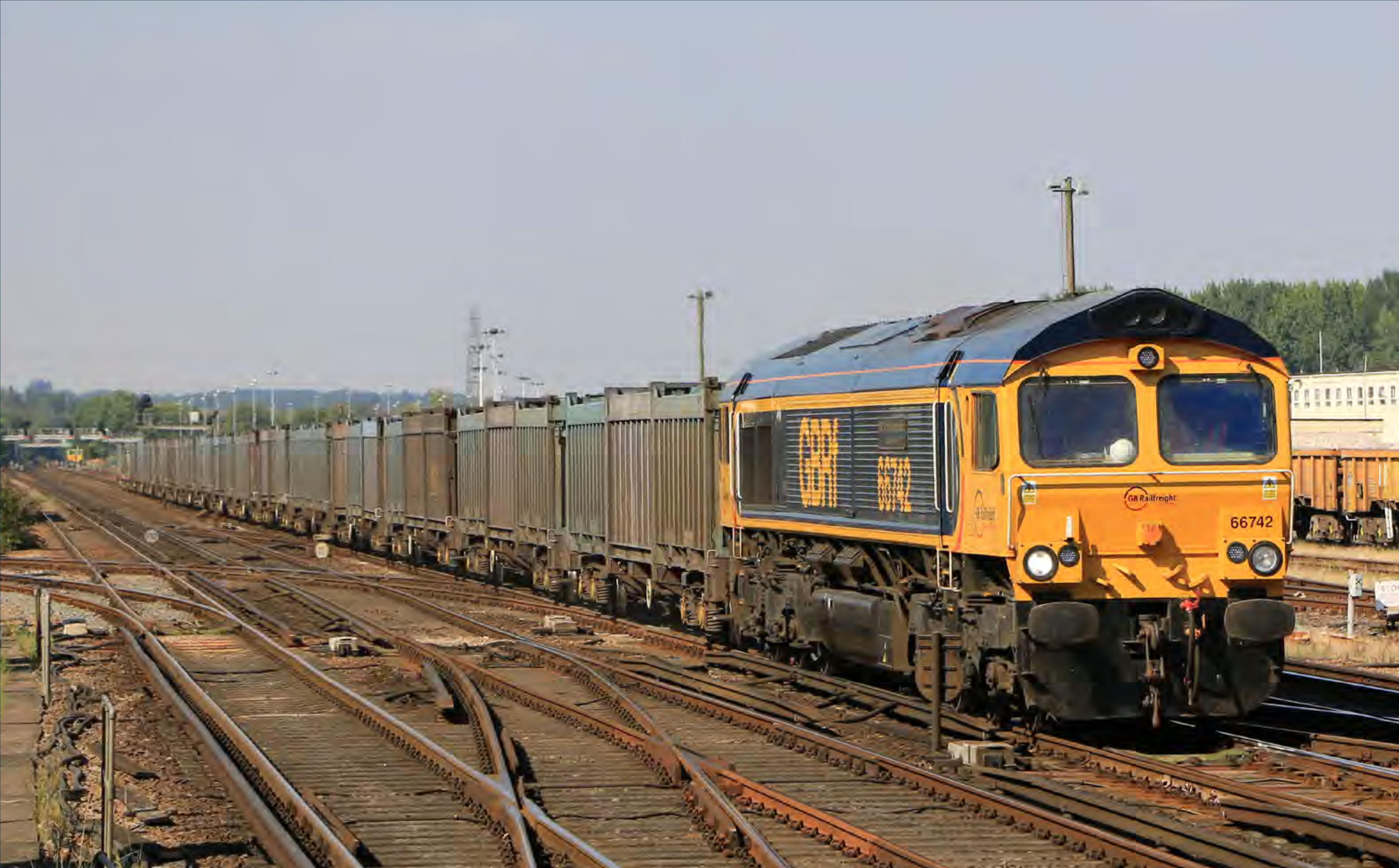
▶ Class 66 742, working a Mountfield to Southampton Docks loaded Gypsum train, passes through Eastleigh on August 17th.