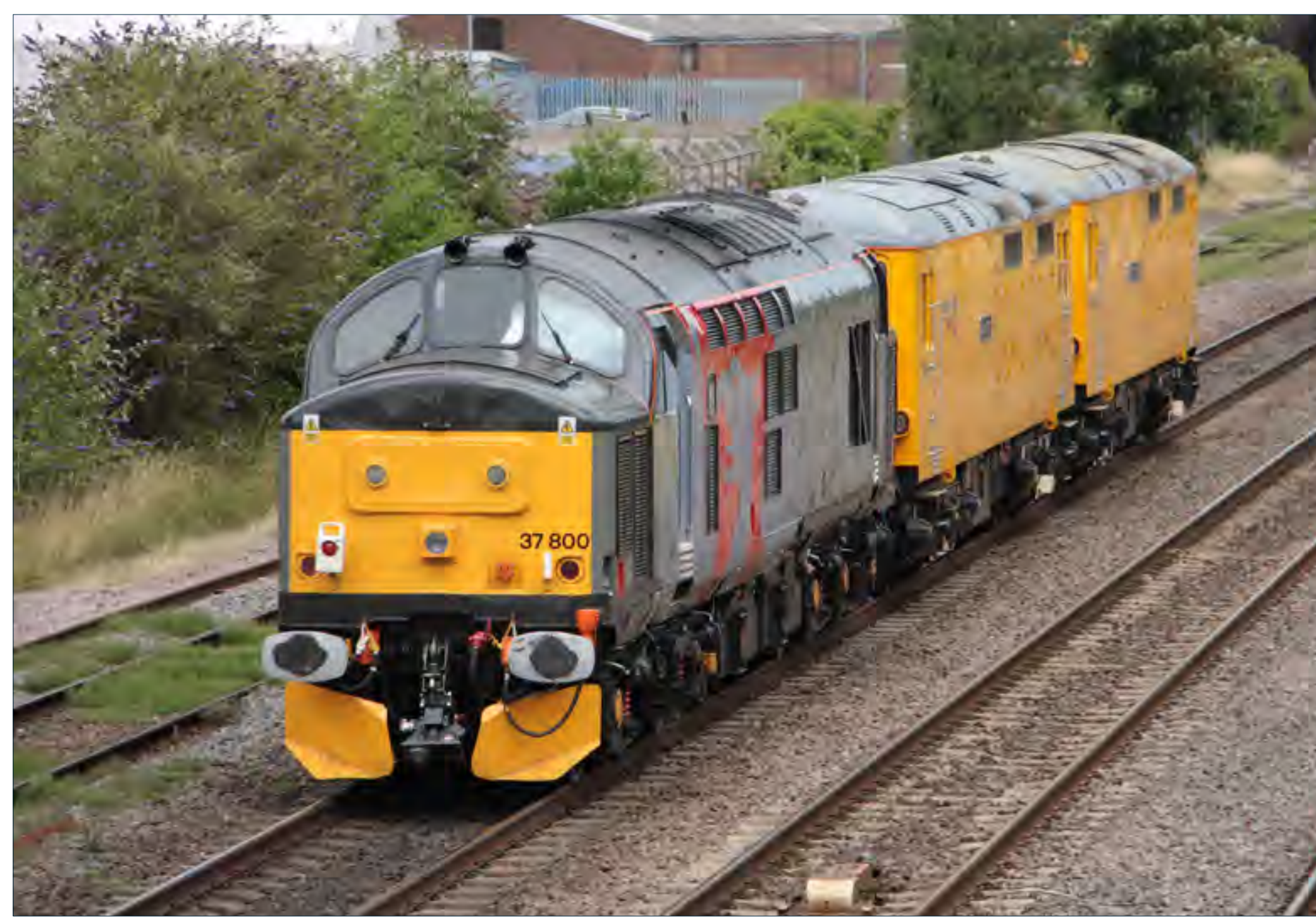
▶ Class 37 800 passes Kettering North Junction dragging South Eastern's Class 375 702 on the 13:56 Acton Lane to Derby Litchurch Lane, August 14th. Derek Elston