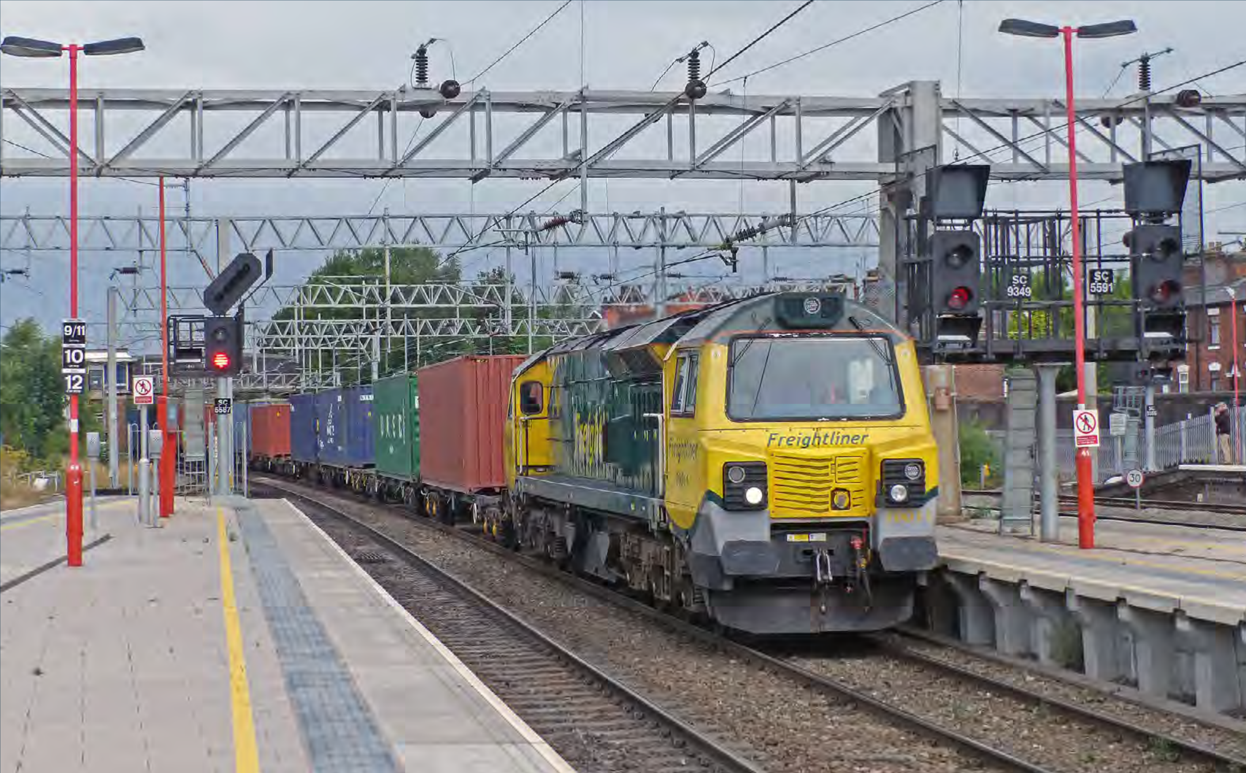
▶ Class 70 011 eases a Crewe - Southampton liner through Stafford on August 11th.