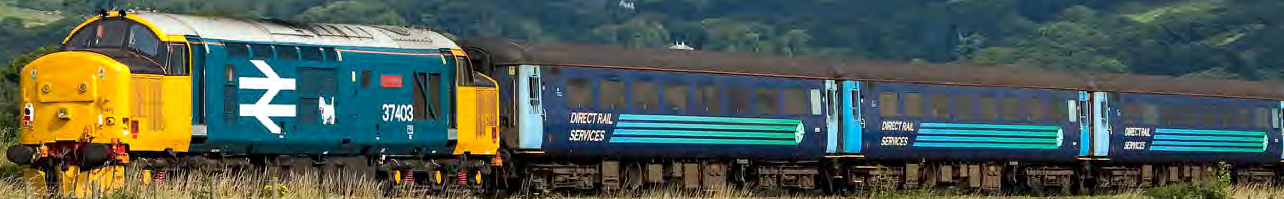
Class 37 403 working the 2C40 Carlisle - Barrow, heads past Green Road on August 6th. Carl Grocott