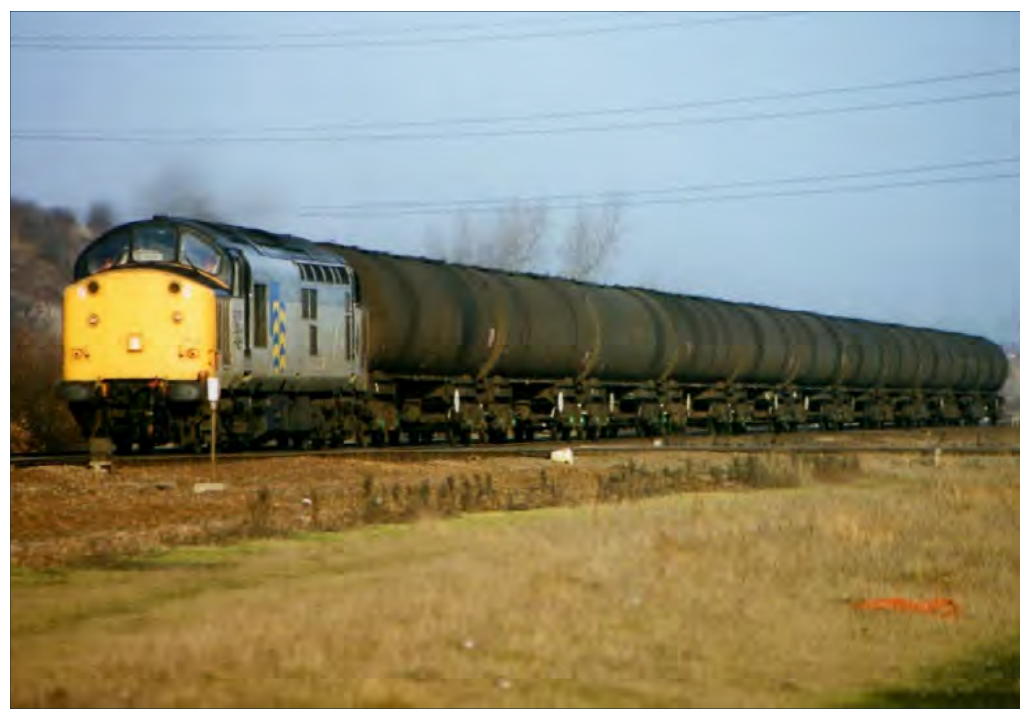
▶ EW&S liveried Class 37 717 is pictured stabled on Newport Godfrey Road on September 4th 1999. Paul Godding