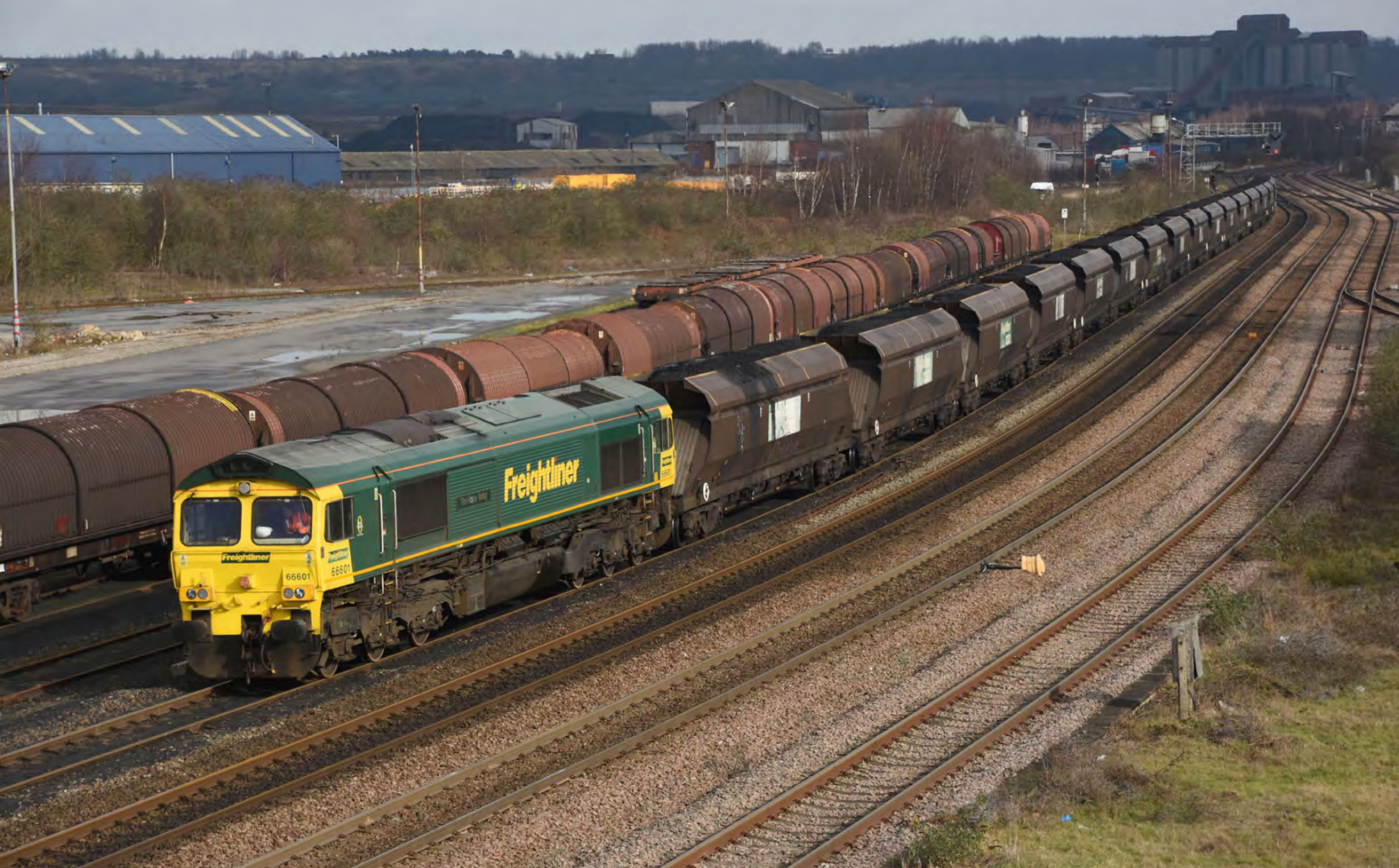
Class 66 601 has been working the Immingham - Scunthorpe coal circuit for the first time and on February 17th, a little patch of sun greeted it as it arrived at Frodingham Jct. to run round 6C75 prior to going into the CHP.