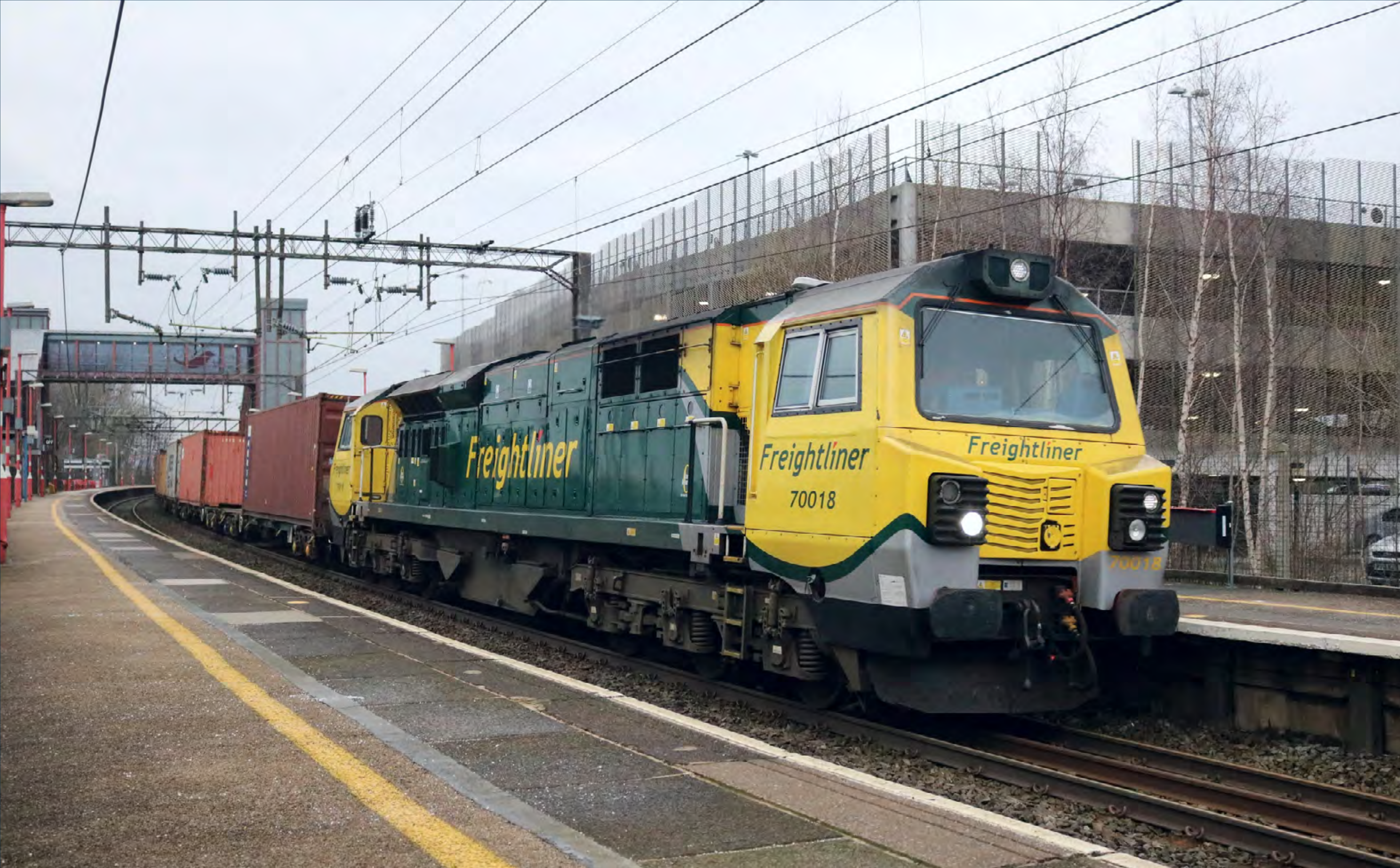
▶ Class 70 018 heads through Runcorn on February 11th working the 4K45 12:52 Ditton (O'Connor) F'liner to Crewe Basford Hall