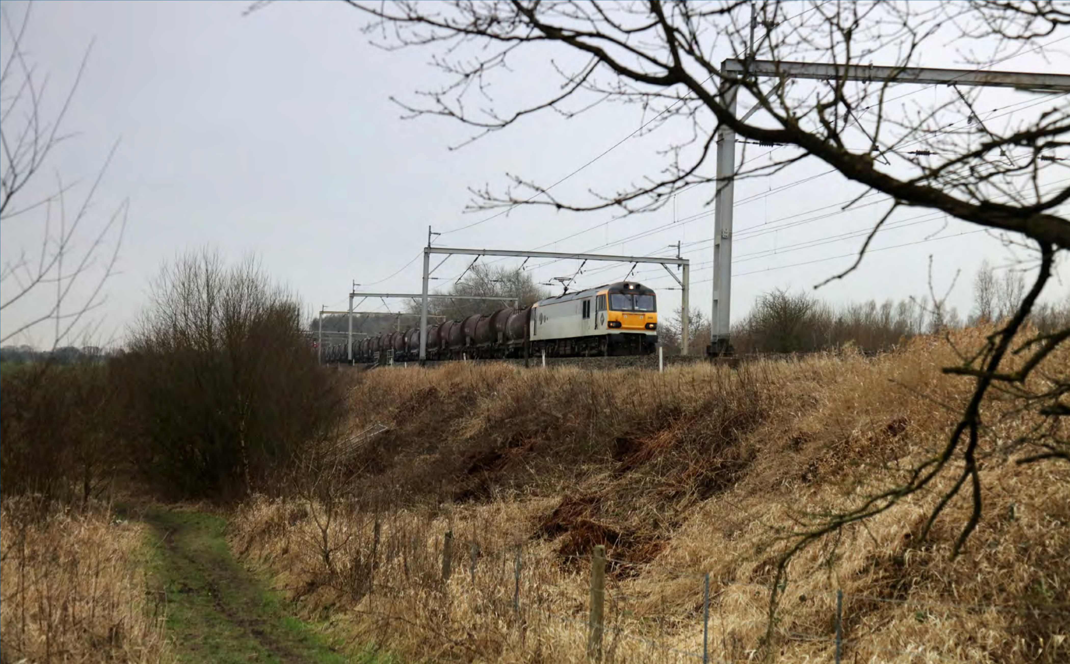
On February 15th, Class 92 044 whines north through Bamfurlong, near Wigan, with the (fairly) regular Dollands Moor - Irvine china clay train.