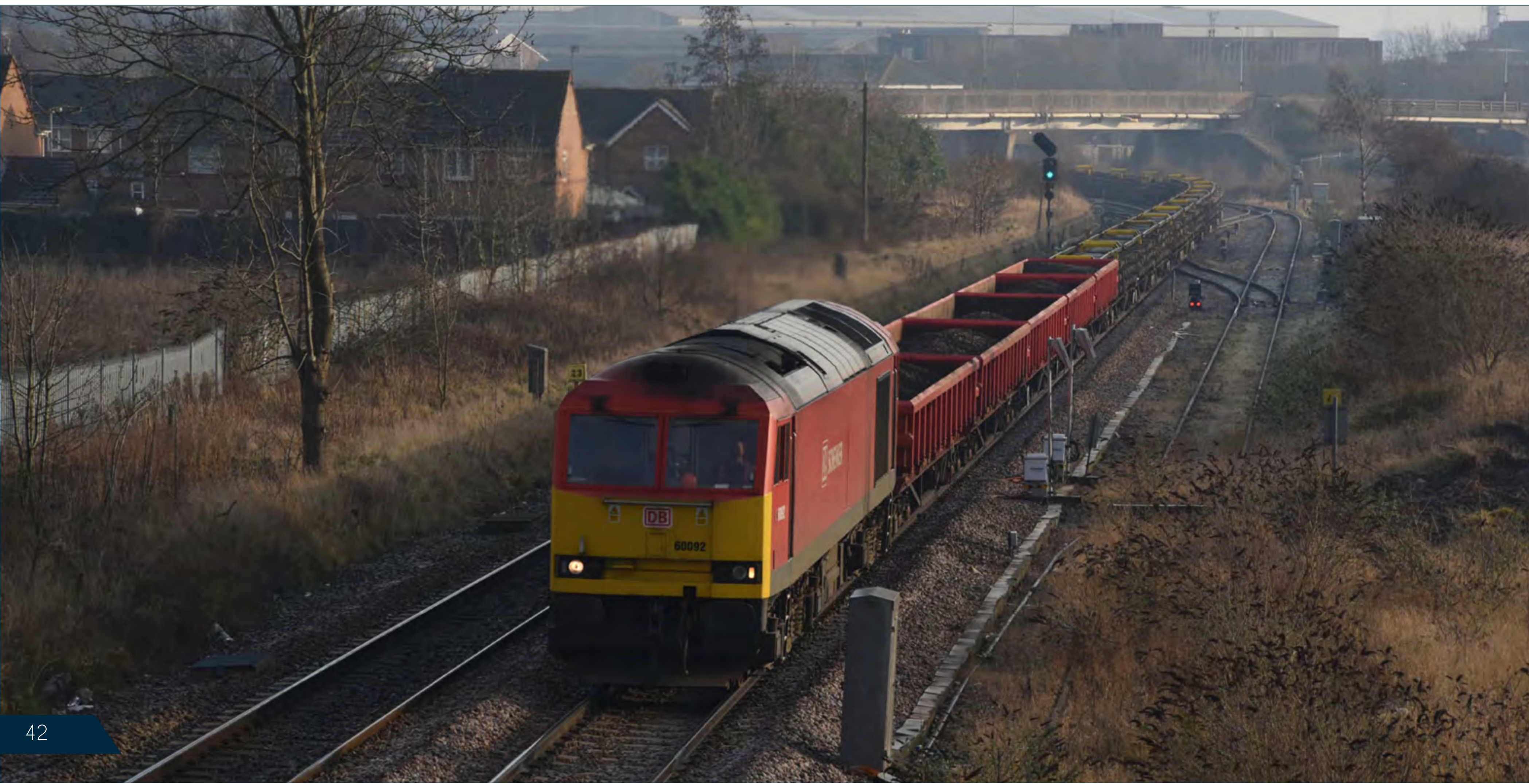
On January 22nd, Class 60 092 worked 6B01 Holton-Le-Moor to UpDecoy, a few spoil wagons and a nice long rake of track panels, seen here approaching Scunthorpe.

For more information about the Settle-Carlisle line visit: www.northernrailway.co.uk/