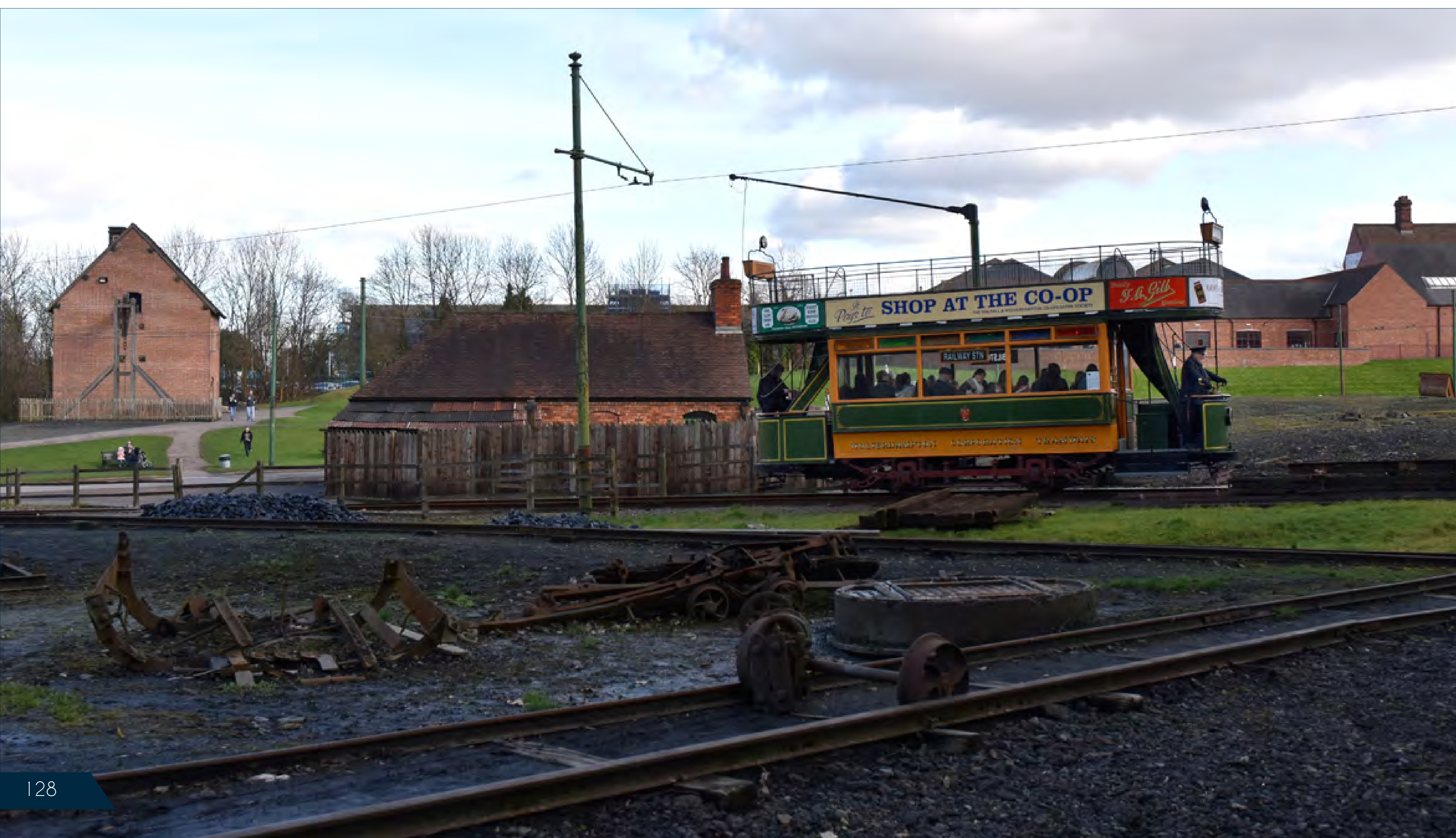
It was a busy Half Term for the Black Country Living Museum in Dudley, West Midlands. A number of their transport exhibits were in operation, with the electric tramway being operated by former Wolverhampton Corporation Tramways double-decker No. 49. The tram is seen climbing past the coal mine (with the Newcomen Beam Engine at the back-right), having just crossed the main road, on February 24th. Ben Bucki