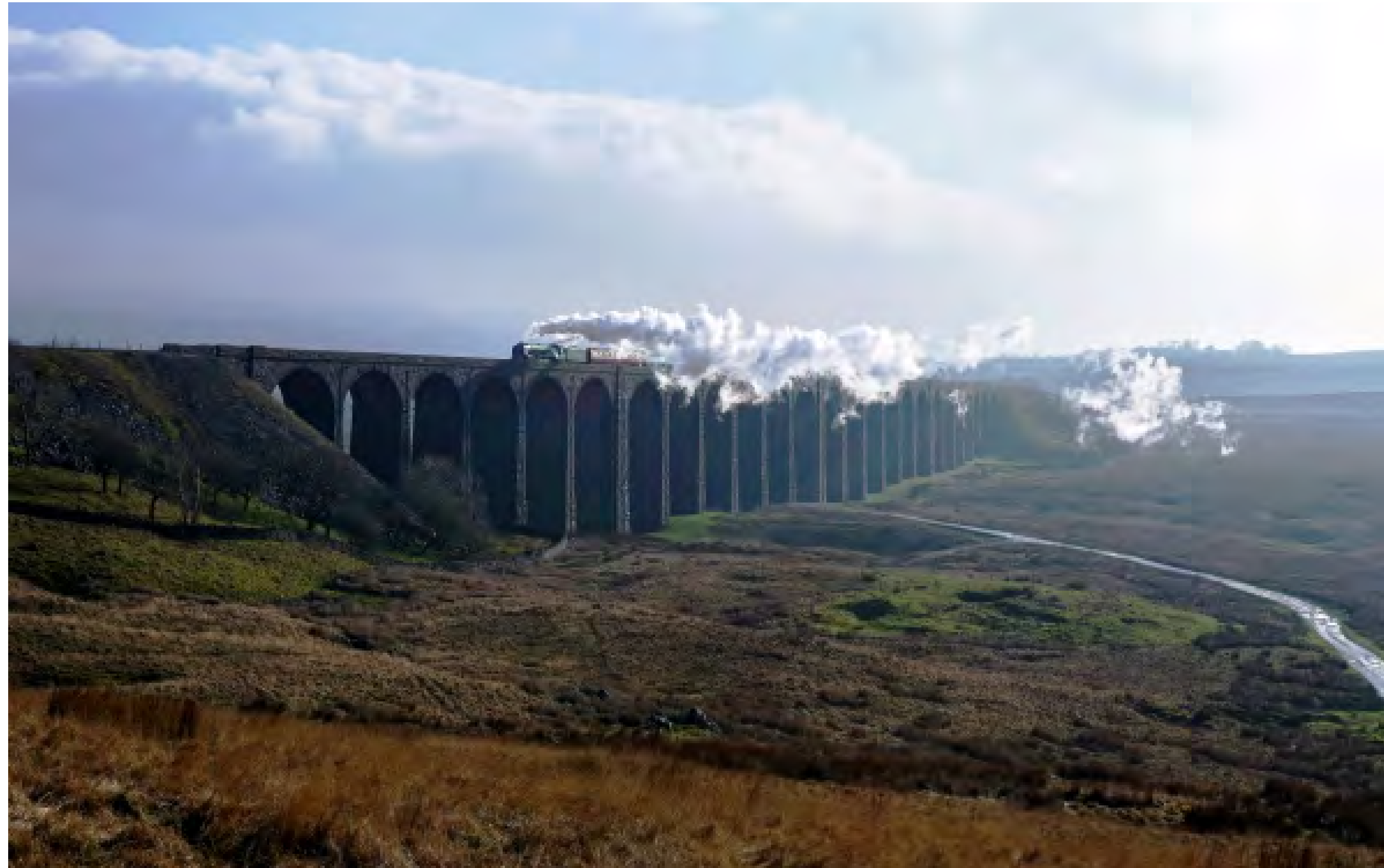
A photo that captures the essence of the S&C, Tornado on Ribbleshead Viaduct – February 2017.

For further information about these tours and to buy tickets, please contact our booking agent through www.ukrailtours.com or call 01438 715050. The Trust respectfully requests that anyone wanting to see Tornado follows the rules of the railway and only goes where permitted.