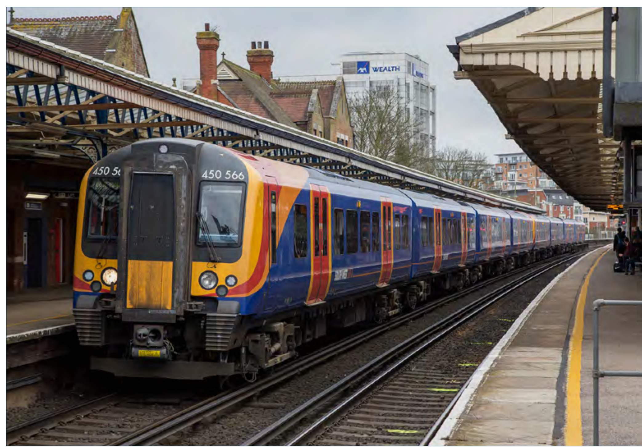
Working a London Waterloo bound service on February 25th, South West Trains' Class 450 566 stands at Basingstoke, awaiting departure time.