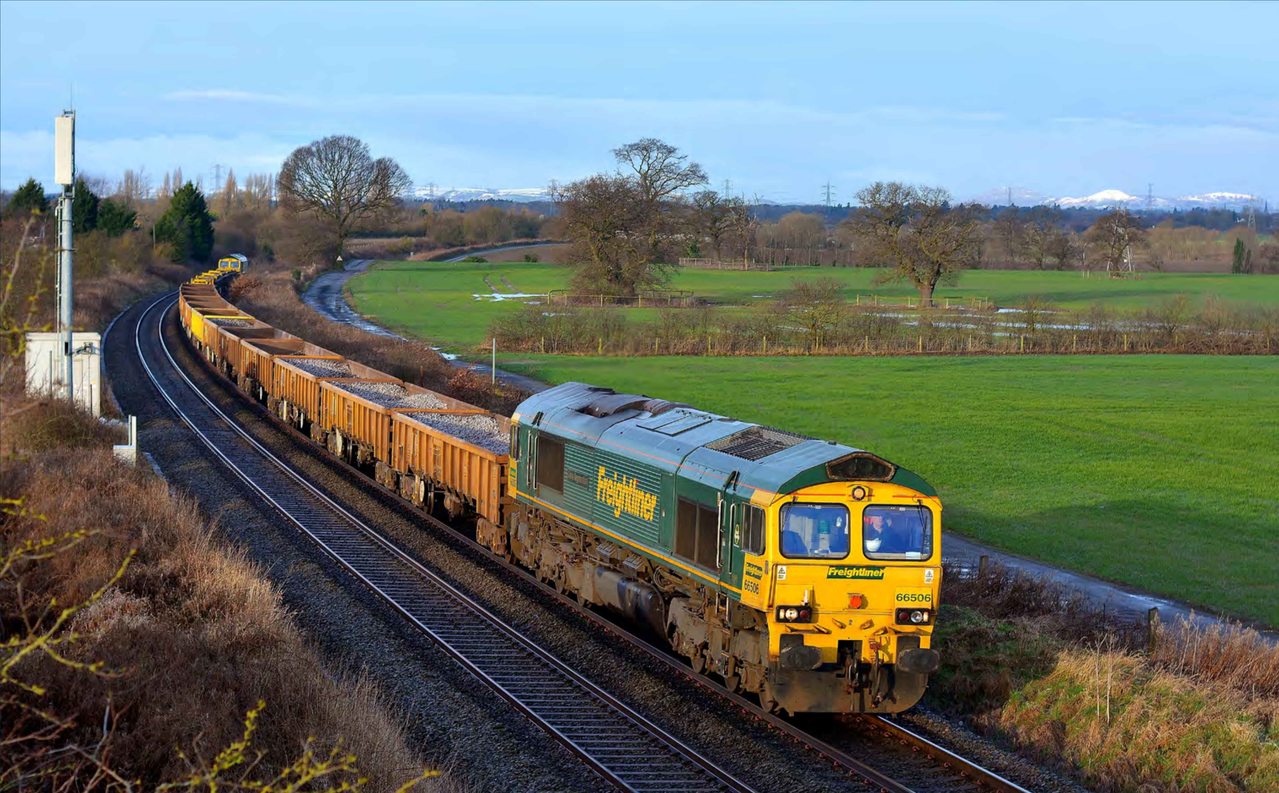
Class 66 506 and 66 598 top'n'tail the 6Y60 06:00 Dee Marsh Jct. - Crewe Basford Hall past Duncote Mill on February 28th.