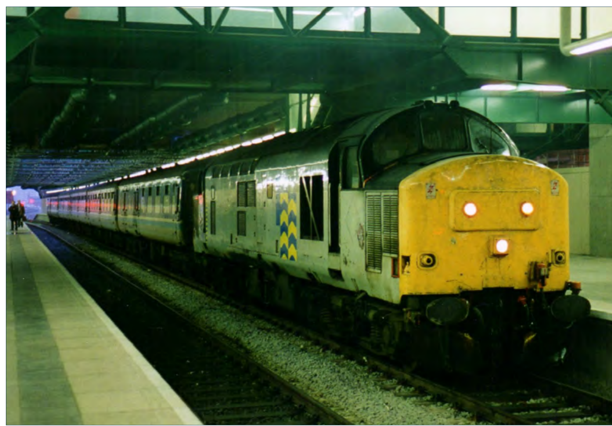
Class 37 418 is seen with a 'Club' train at Manchester Victoria on January 21st 1994.