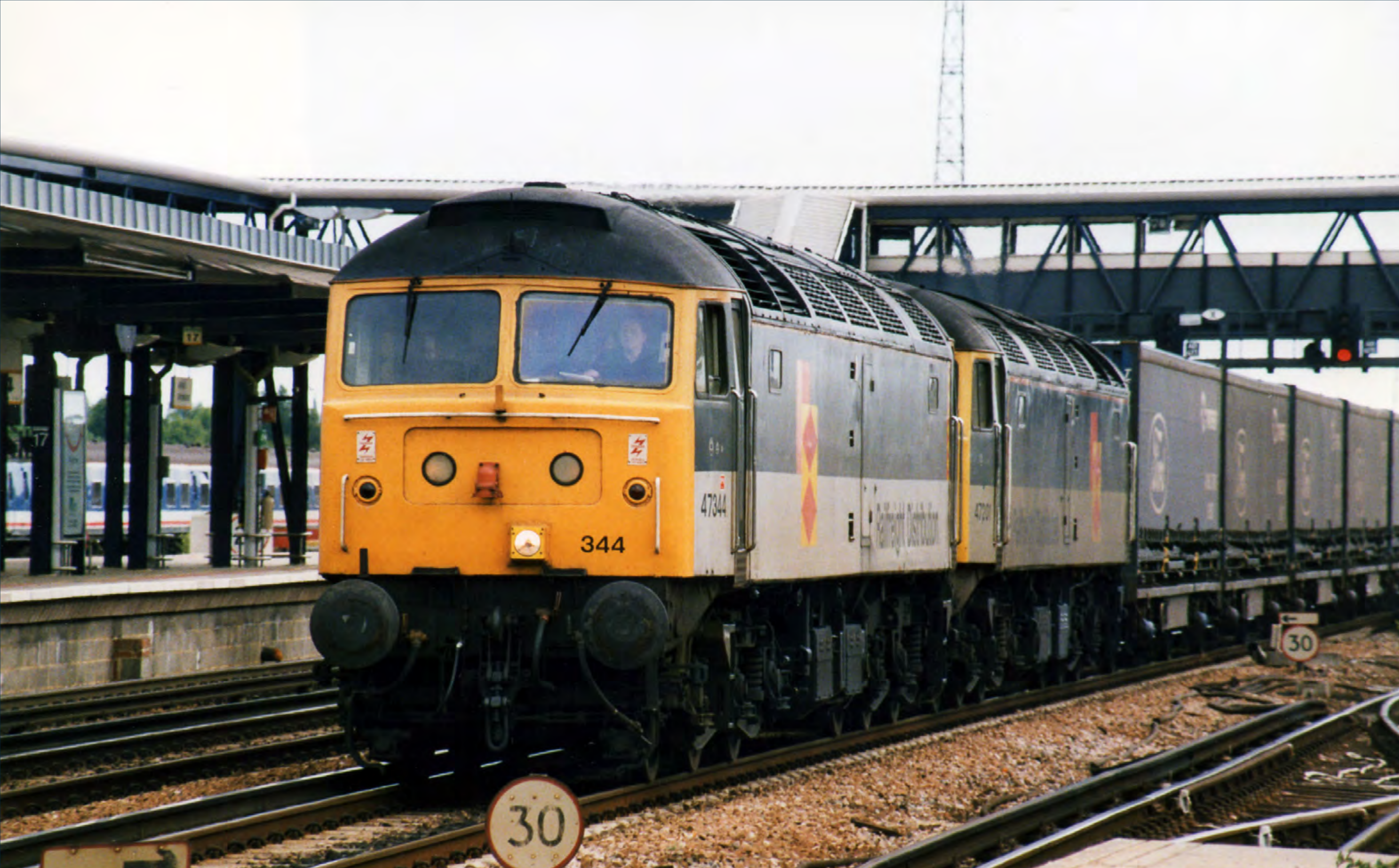
▶ Railfreight Distribution liveried Class 47 344 and 47 201 storm through Ashford with a rake of Ford parts wagons on June 17th 1998. Paul Godding