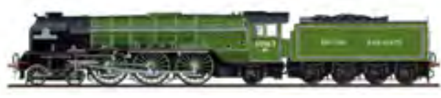
The A1 Steam Locomotive Trust New Steam for the Main Line