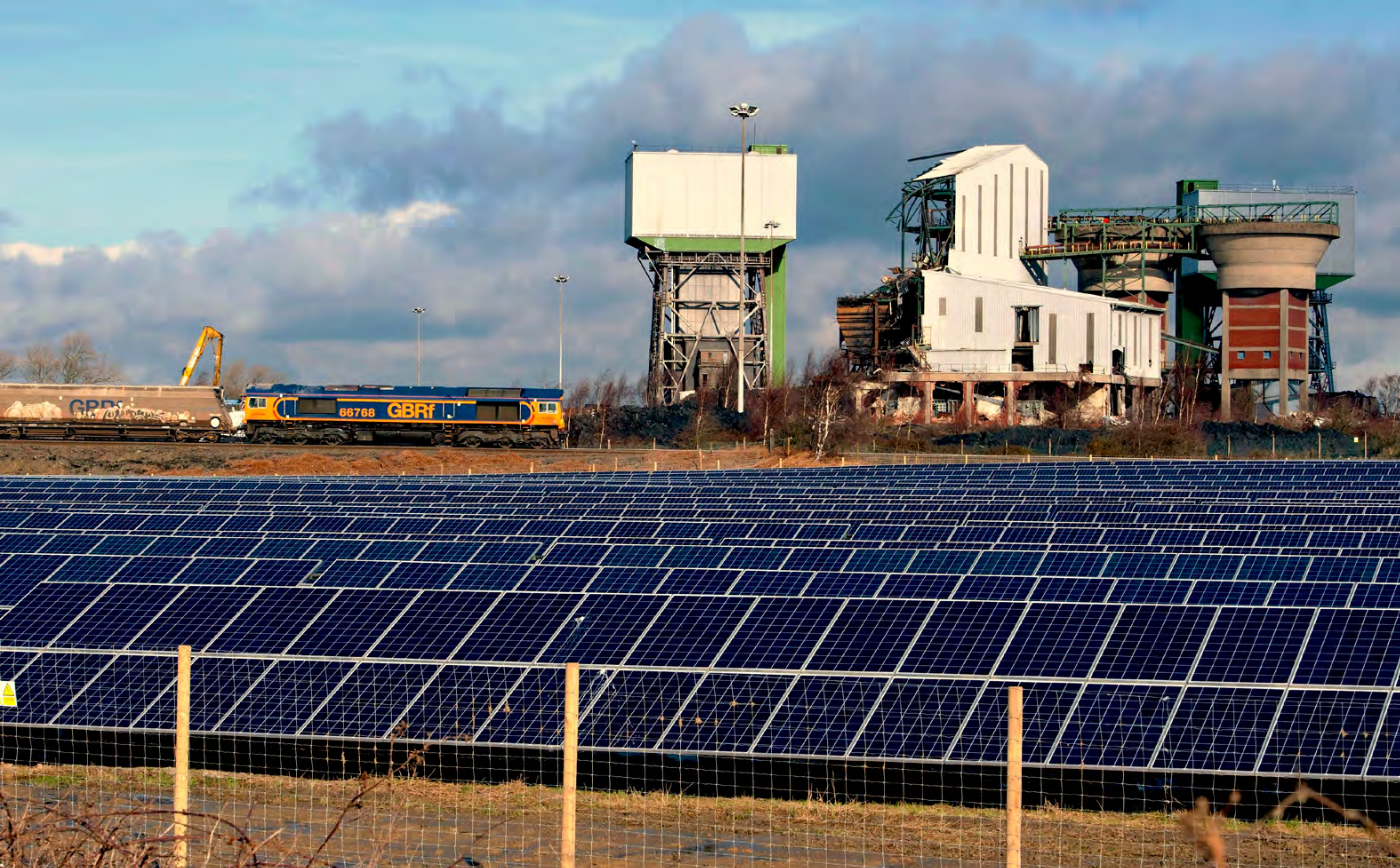
Class 66 768 works the 6H12 Tyne Coal Terminal to Drax power station loaded coal train past the now partially demolished Kellingley Colliery on February 28th. Neil Scarlett