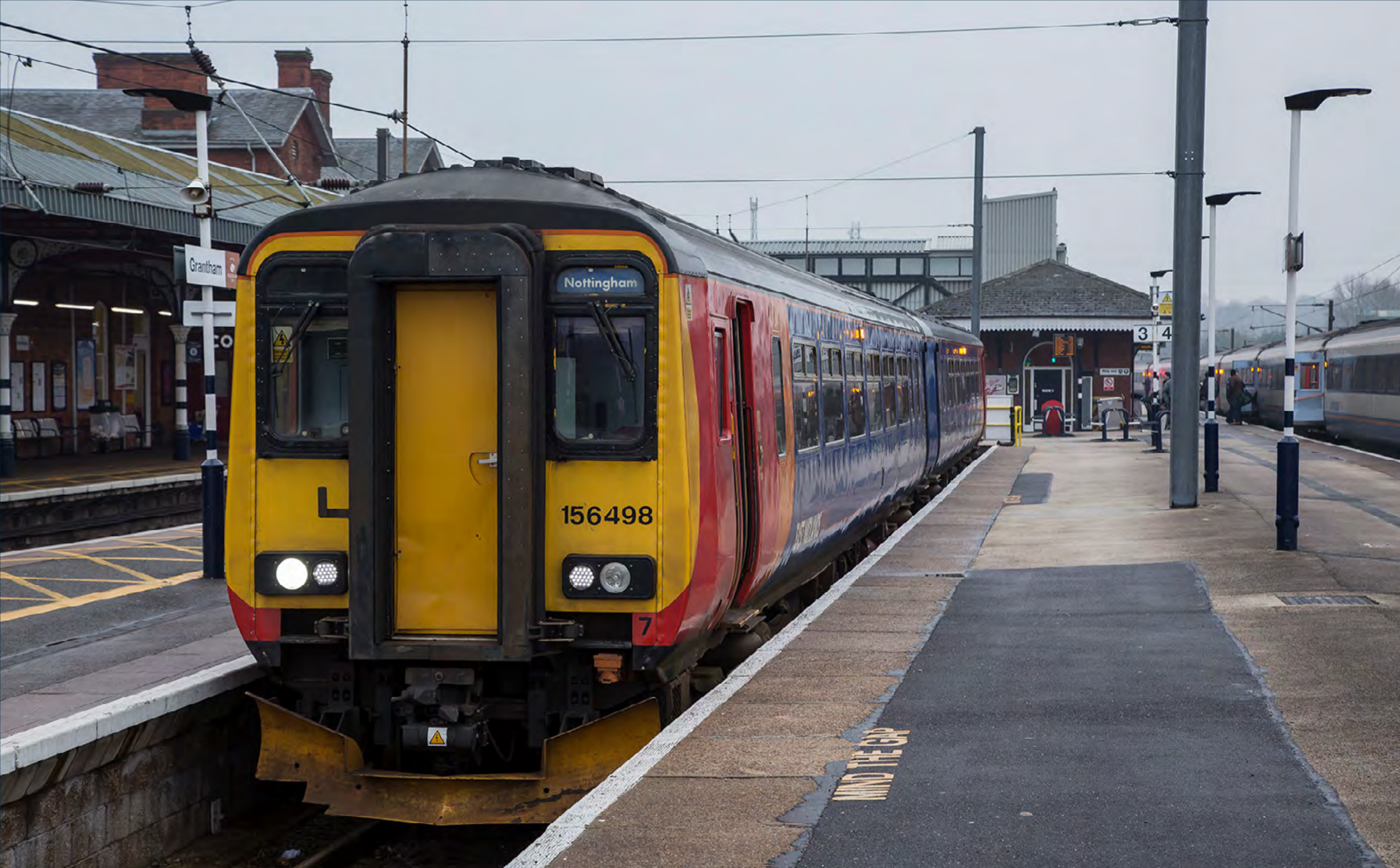
East Midlands Trains' Class 156 498 stands at Grantham on February 11th working a Skegness to Nottingham service.