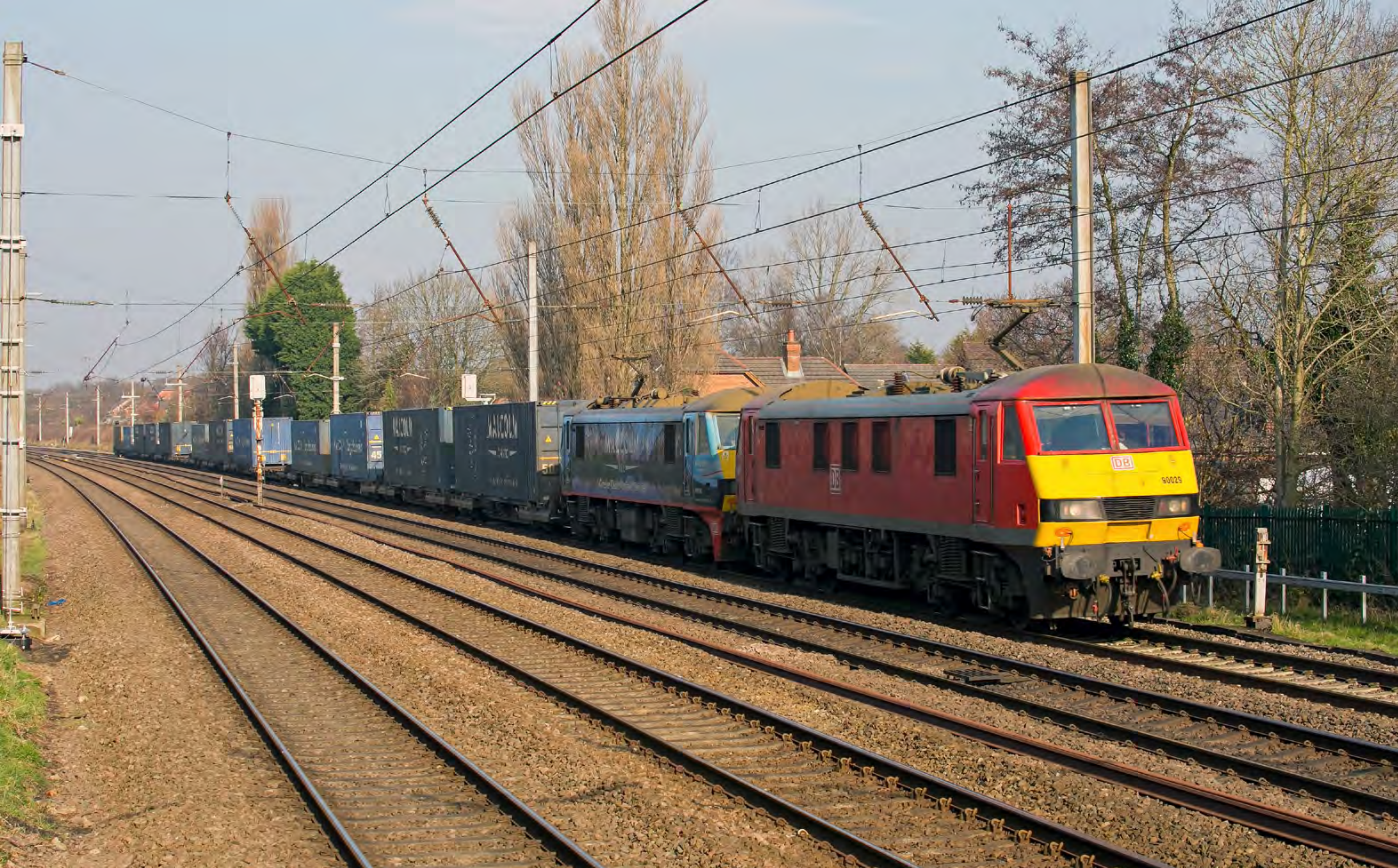
Class 90 029 and 90 024 work the 4M25 Mossend - Daventry modal through Village Croft, Euxton on February 14th. Alan Naylor