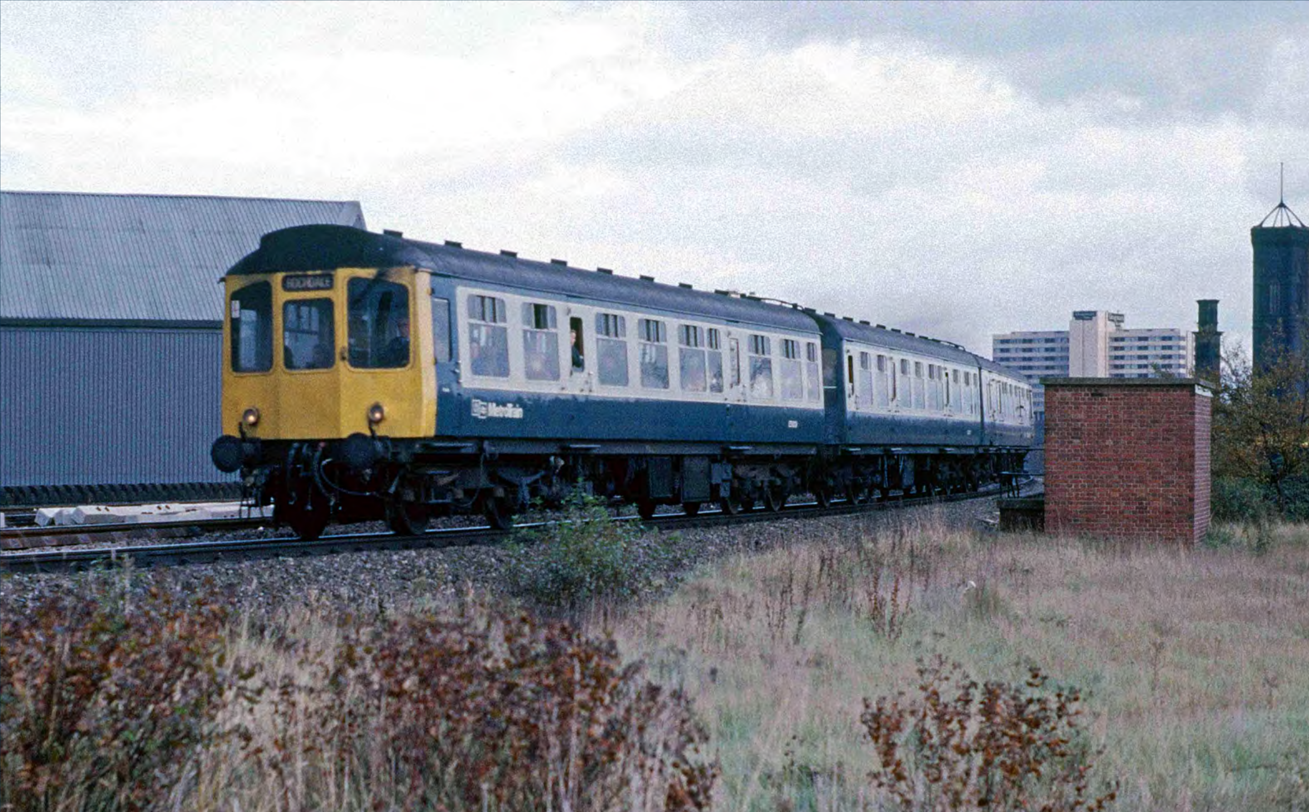
BR Class 110 DMCL No. 51829 leads a Leeds - Rochdale service past Whitehall Jct. Leeds, on November 9th 1985.