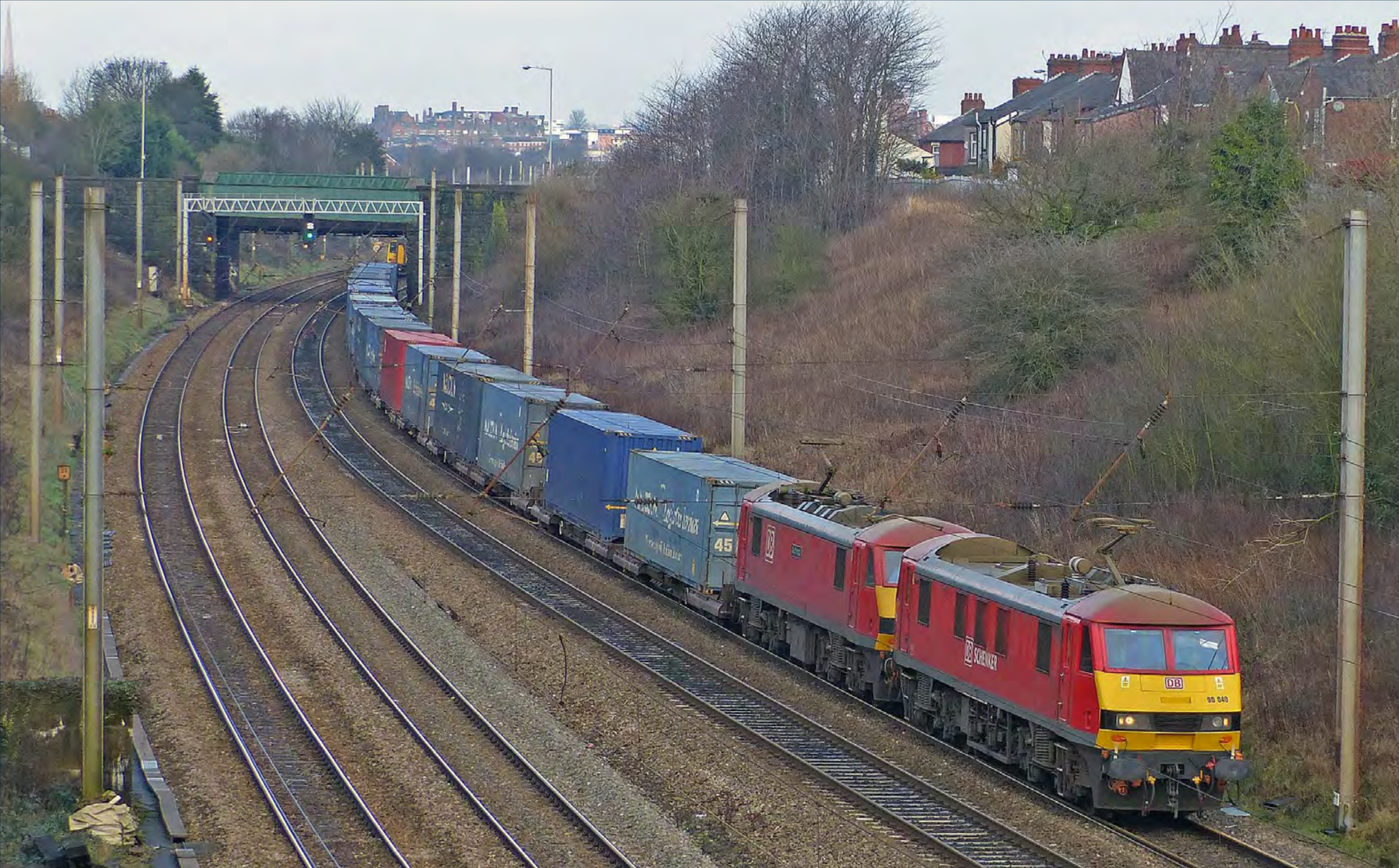
▶ Class 90 040 and 90 019 round Farrington Junction curve working the 4M25 Coatbridge - Daventry intermodal on February 1st. Michael Lynam