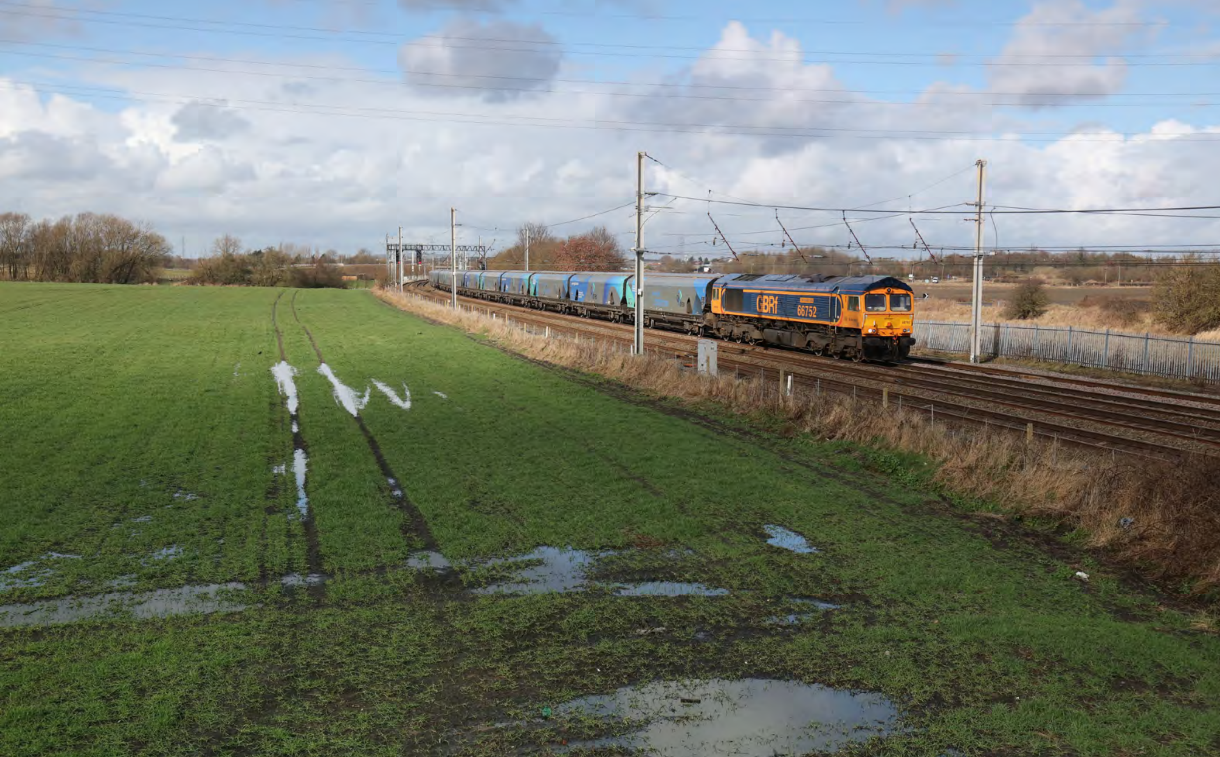
▶ Plenty of water in the fields at Winwick as Class 66 752 catches a fleeting patch of sunshine with a Biomass from Liverpool to Drax on March 1st.