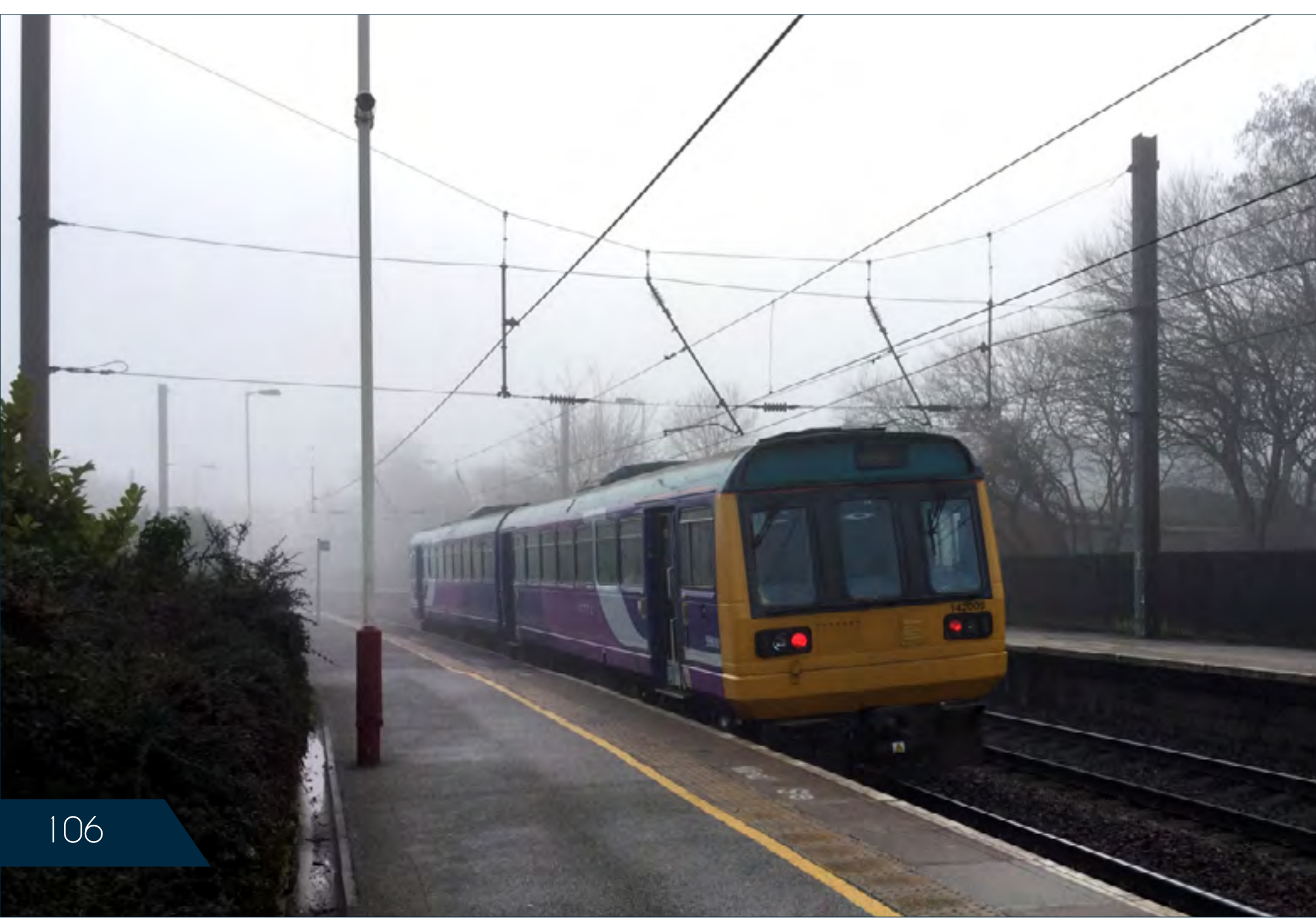
Northern Pacer Class 142 009 draws away from Keighley station with a train for Leeds on a foggy February 6th. Ben Bucki