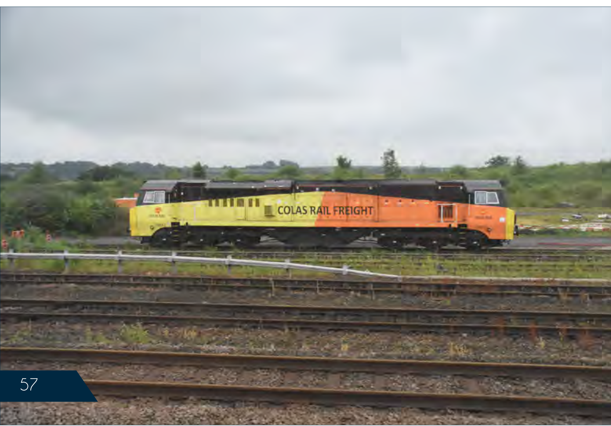
Class 70 812 works the 6C48 Crewe - Bromfield through Steel Heath on June 17th. Carl Grocott