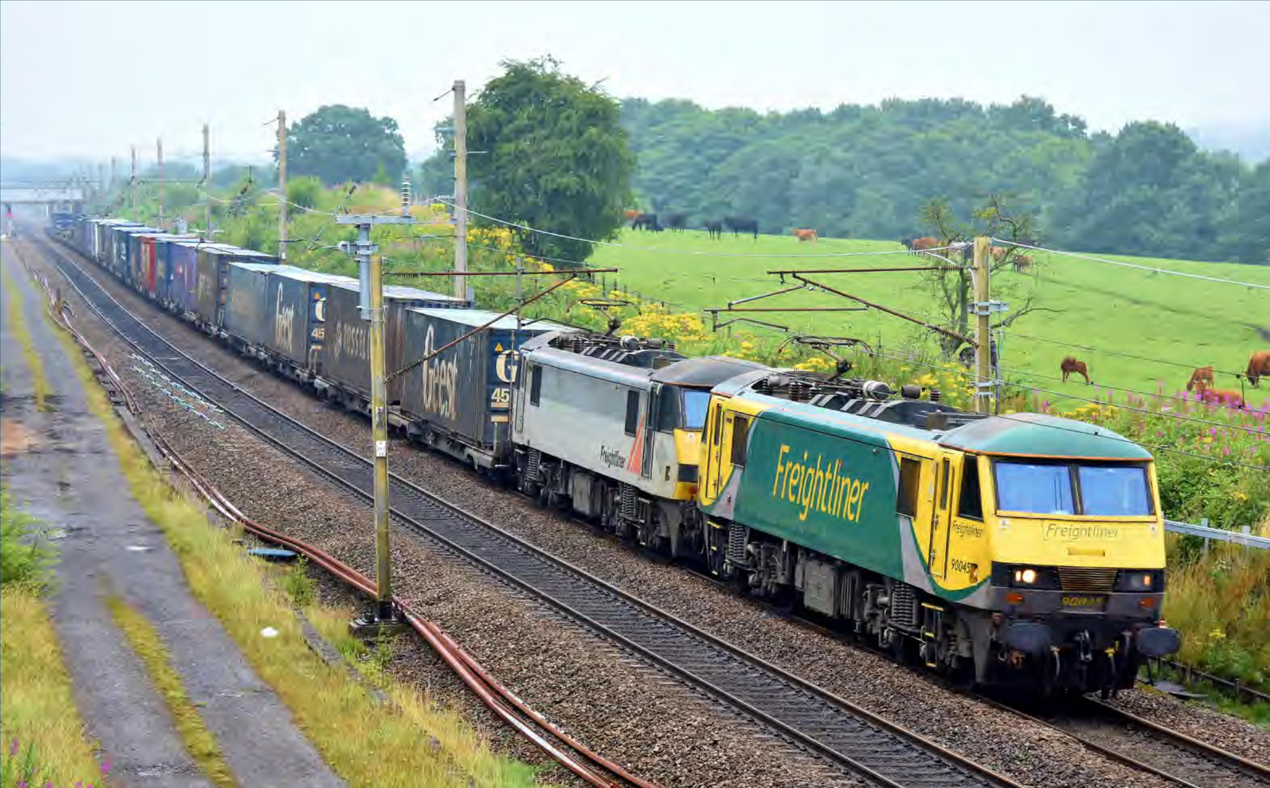
▶ Class 90 045 and 90 048 pass Charnock Richard with the 4M27 Coatbridge - Daventry on July 15th.