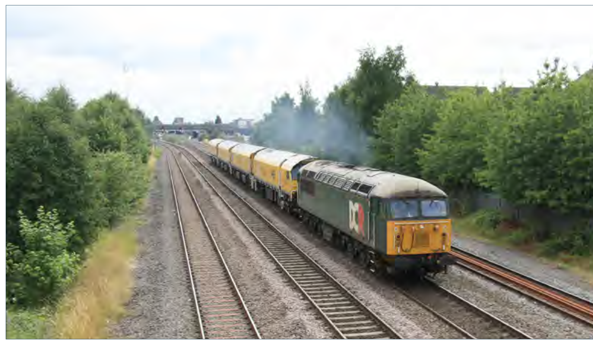
DCR's Class 56 303 with Loram railgrinders, running as 4Z01 Oakhampton (Dartmoor Railway) - Derby Chaddesden sidings, passes Burton on July 7th. Stuart Hillis