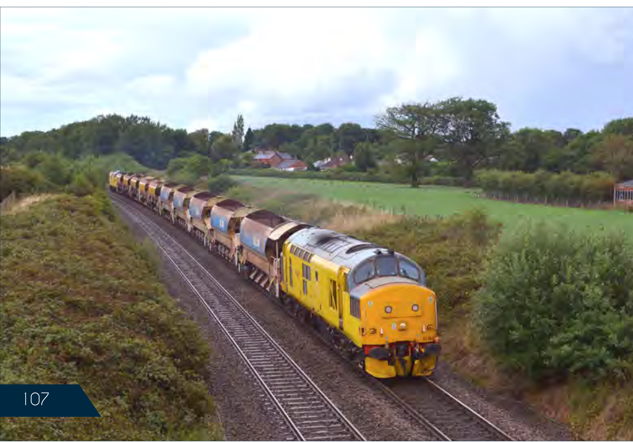
On July 1st, Class 37 175 and 37 254 working the 1Q68 test train pass through Althorpe Station. Steve Thompson