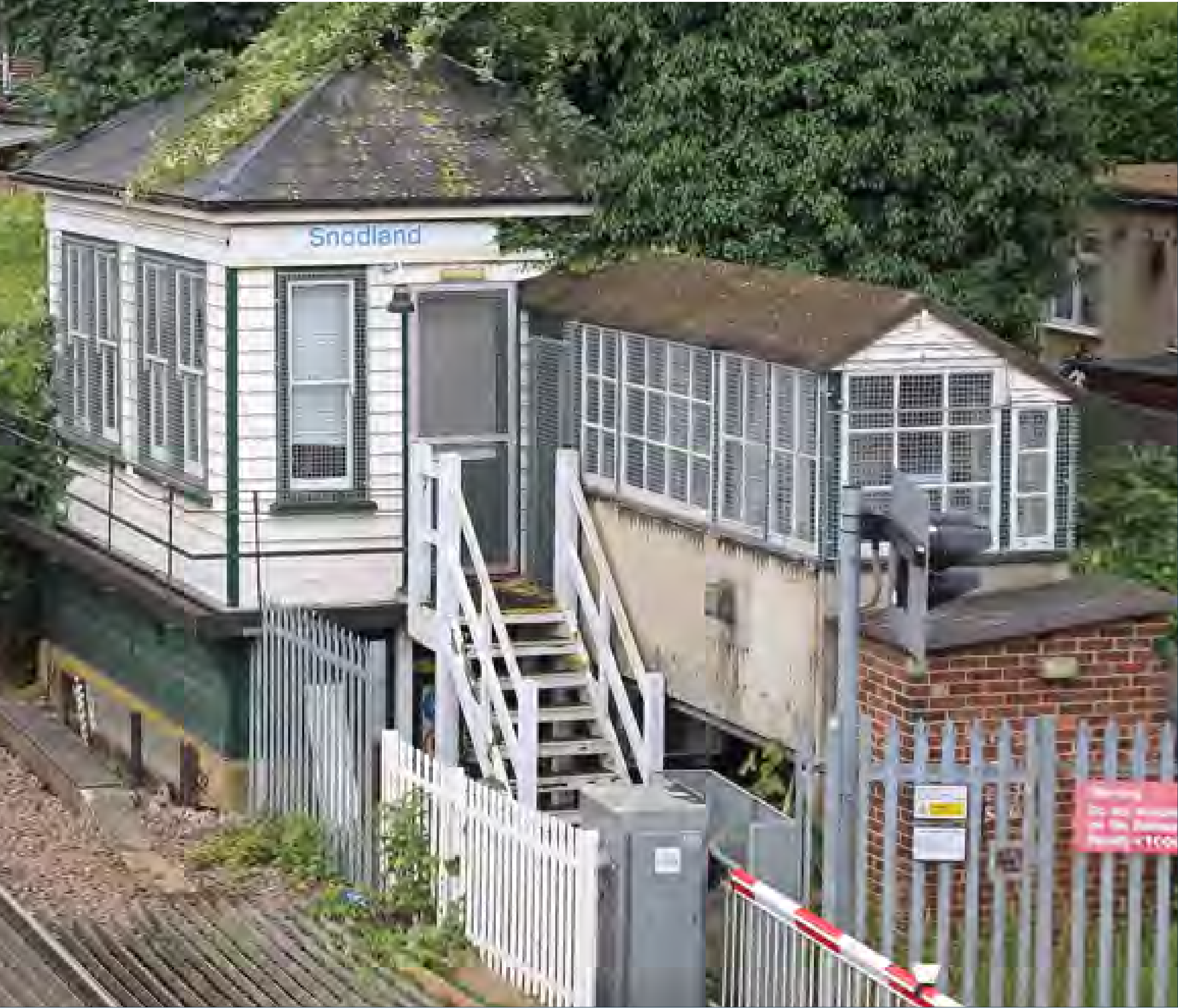
DRS Class 37 059 heads the Redhill - Rochester leg of Pathfinders marathon 'Buffer Puffer 15' passing Snodland on July 29th. The signal box is closed but remains as it is Grade 2 listed along with other signal boxes on the Medway Valley line. Chris Morrison