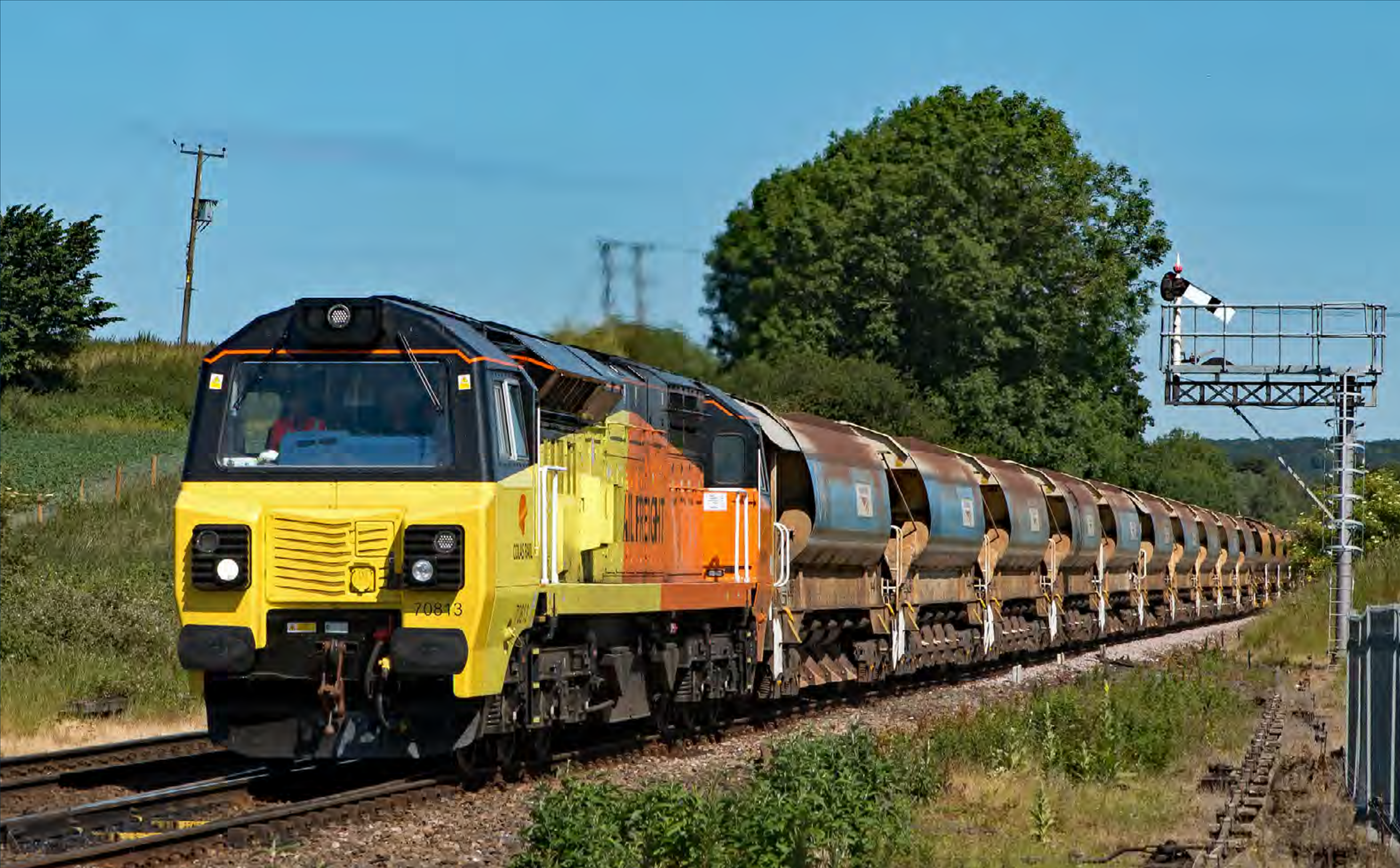
▶ Class 70 813 leads the 6C49 Crewe - Bromfield ballast train through Dorrington on June 18th. Carl Grocott