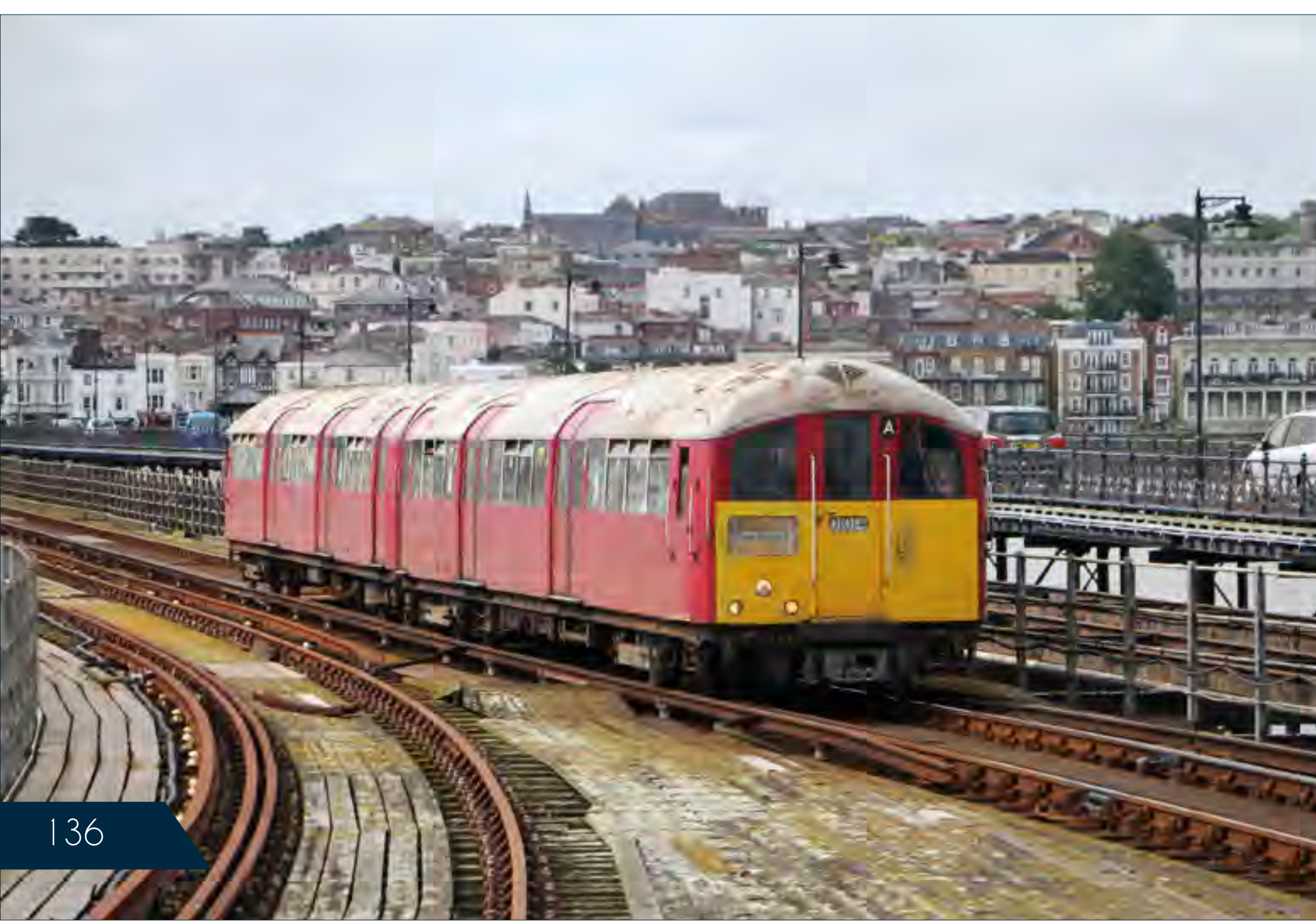
▶ 1938 stock Class 483 008 approaches Ryde Pier Esplanade station bound for Ryde Pier Head. Derek Elston