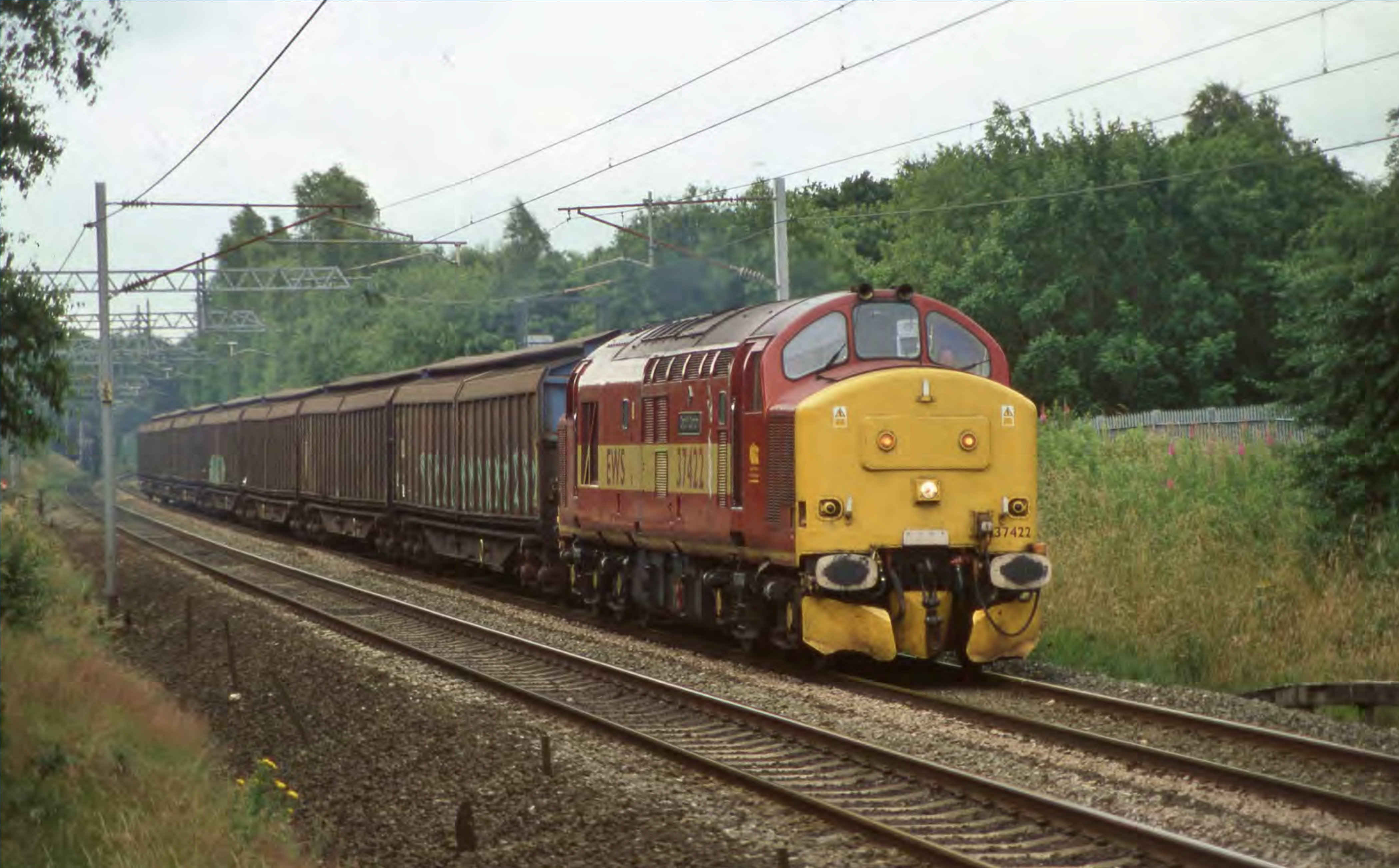
▶ EWS liveried Class 37 422 passes Standish on July 16th 2008 with a Warrington Arpley to Blackburn trip working.