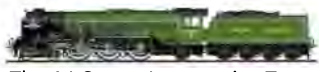
The A1 Steam Locomotive Trust New Steam for the Main Line