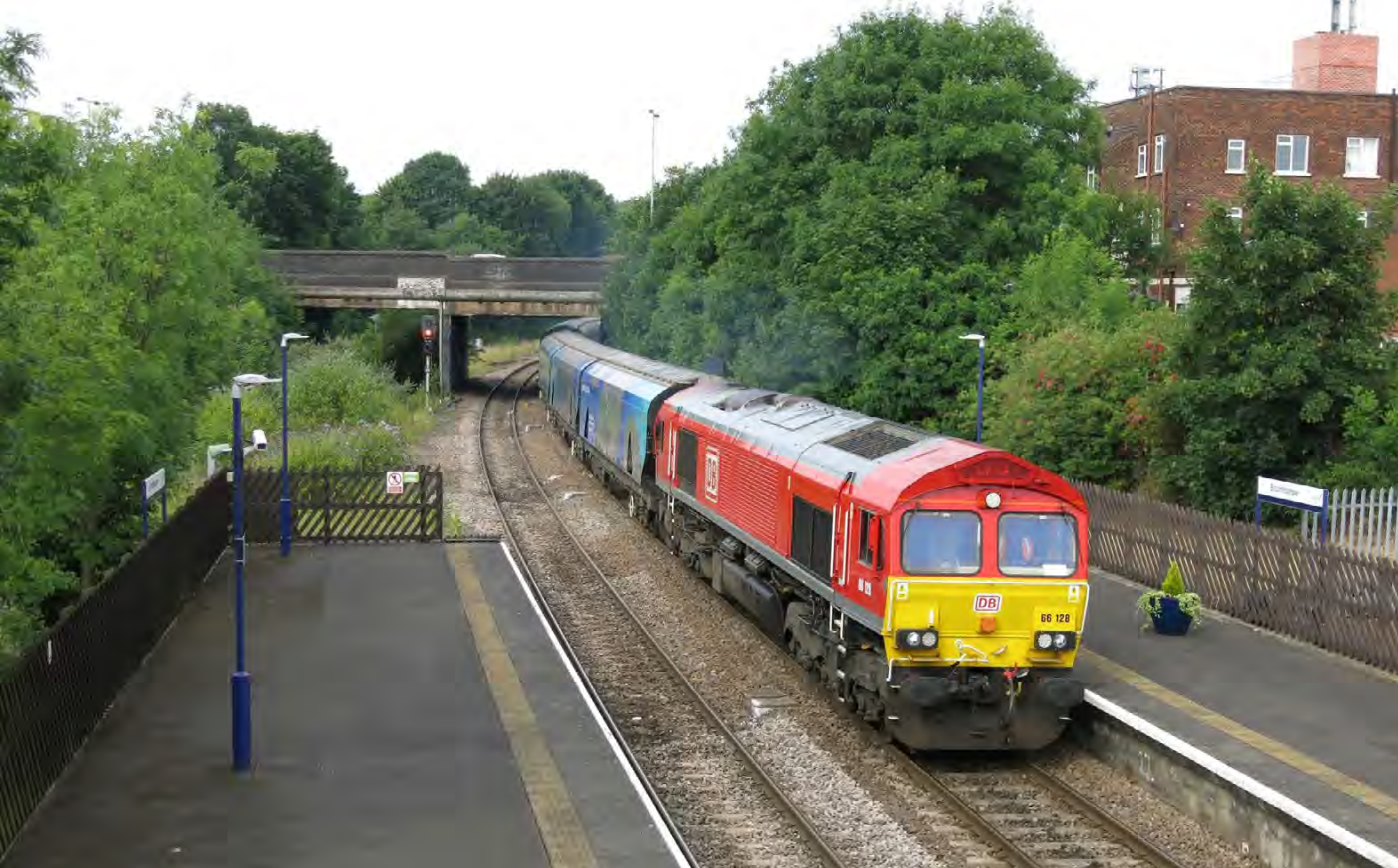
On July 6th, a quite clean Class 66 128 heads through Scunthorpe on 4R49 Drax-Immingham Biomass empties.