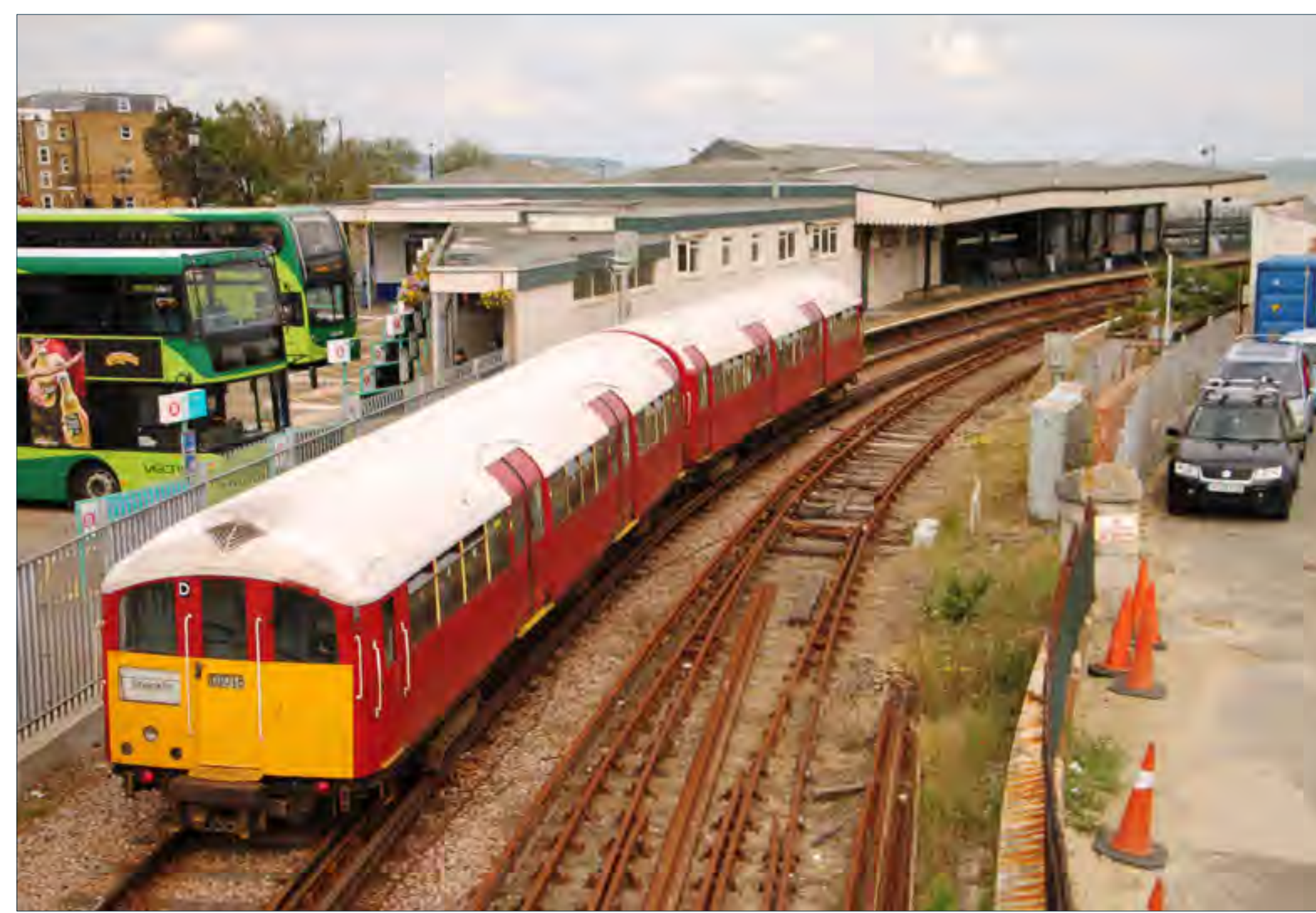
▶ Former London Transport 1938 stock Class 483 004 approaches Ryde Pier Head station. Derek Elston