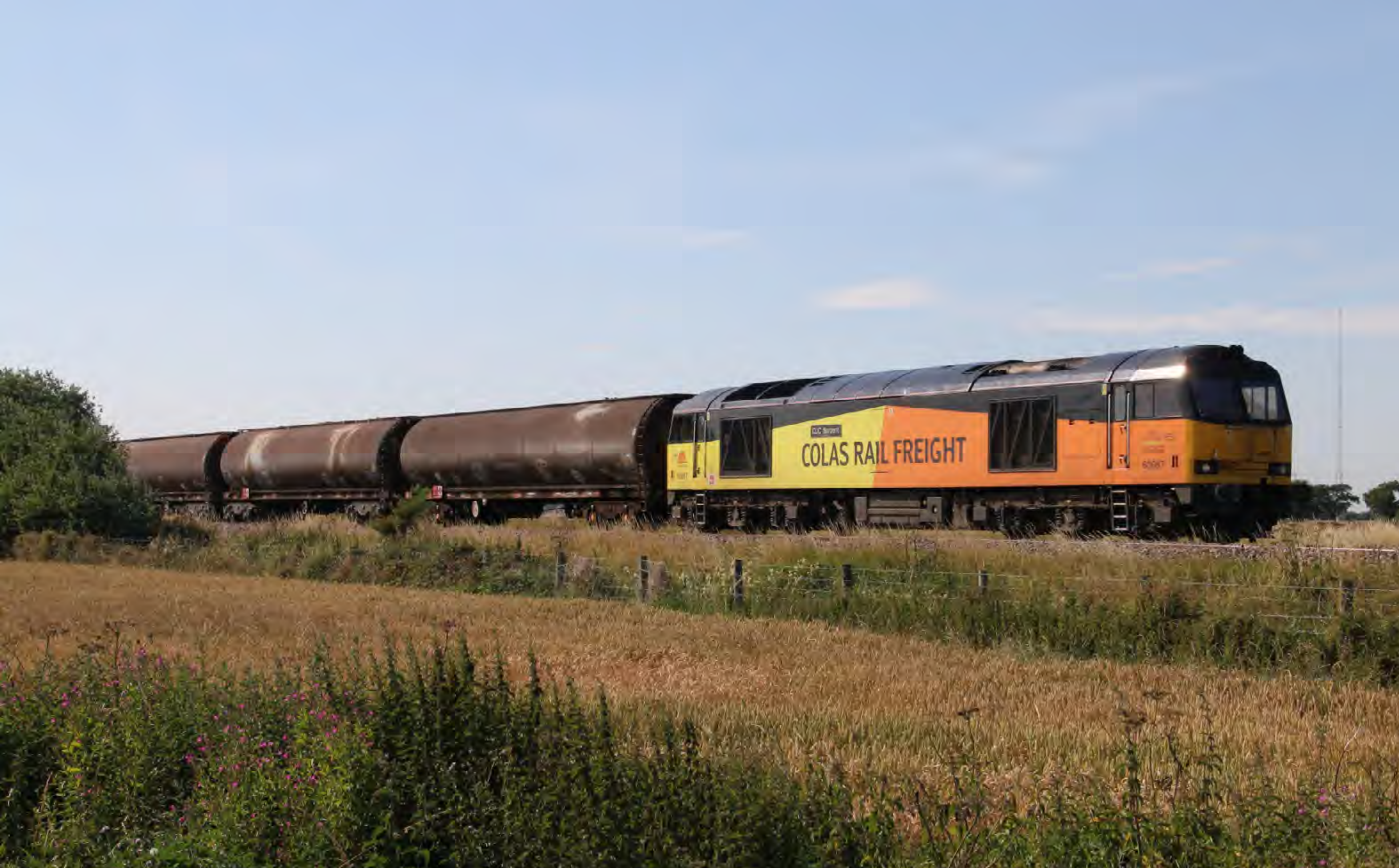
On July 18th, Class 60 087 hauls the Rectory Jct. - Lindsey tanks past Maud's Bridge.