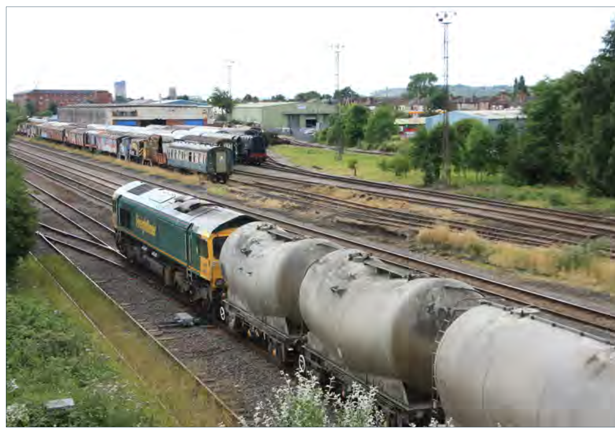
▶ Class 66 537 passes Gospel Oak with a London Gateway to Garston liner on June 16th.