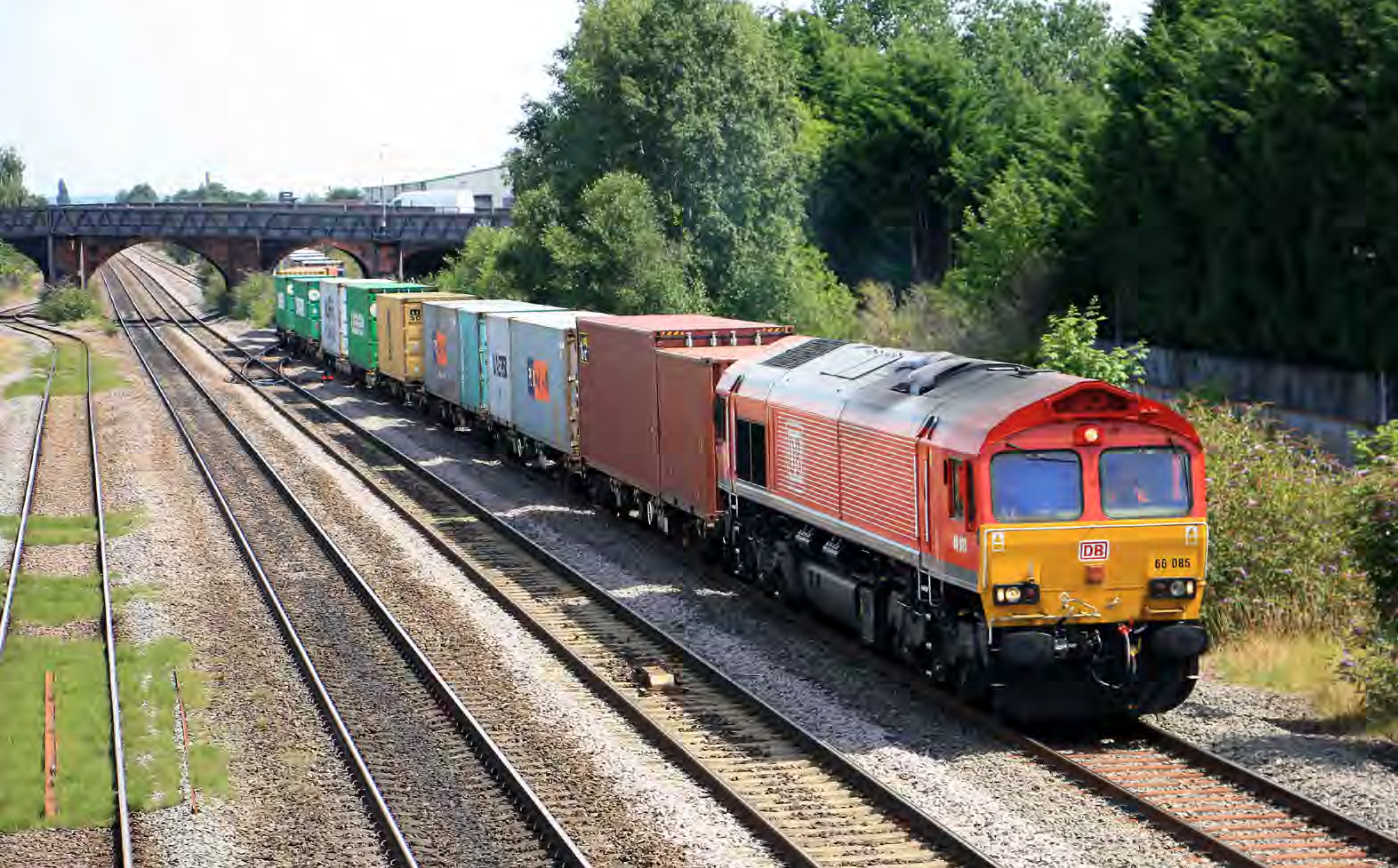
▶ Class 66 085 departs Maurice Hill siding, Burton, working the 4L07 Burton - Felixtowe intermodal on July 18th.