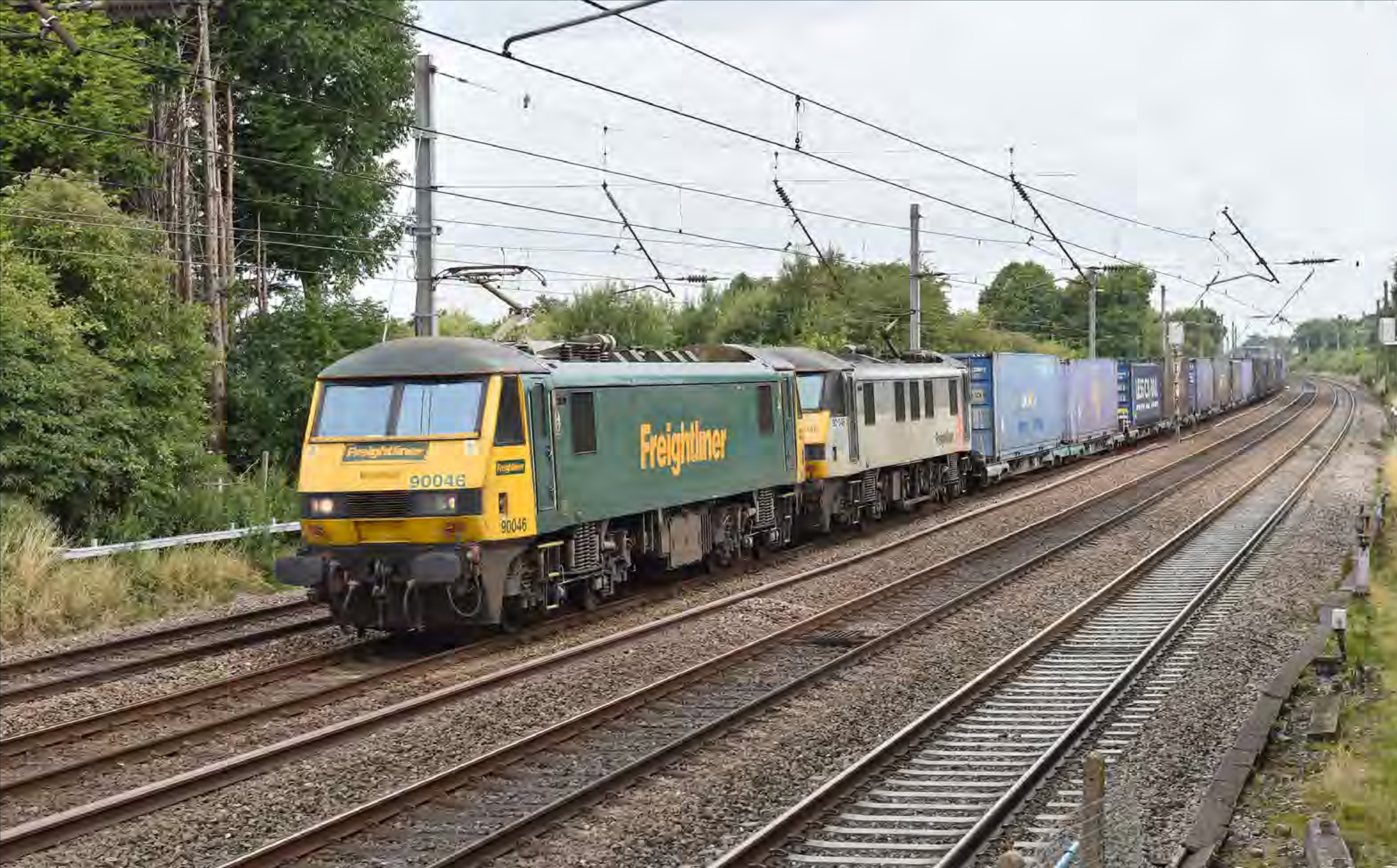
On August 2nd, Class 90 046 and 90 048 lead the 4M27 Coatbridge - Daventry through Euxton. David Hollowood