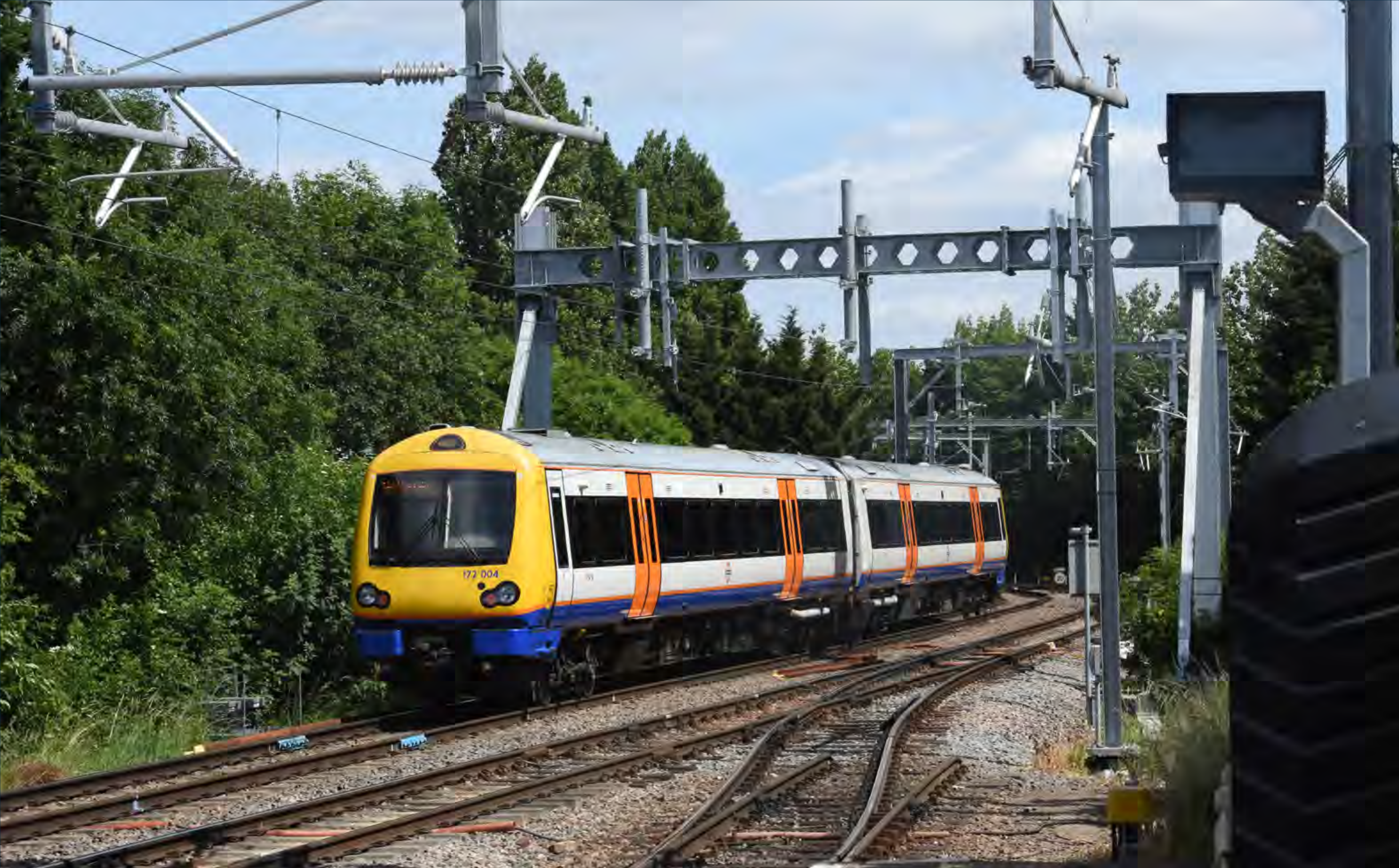
London Overground's Class 172 004 passes Gospel Oak running ECS.