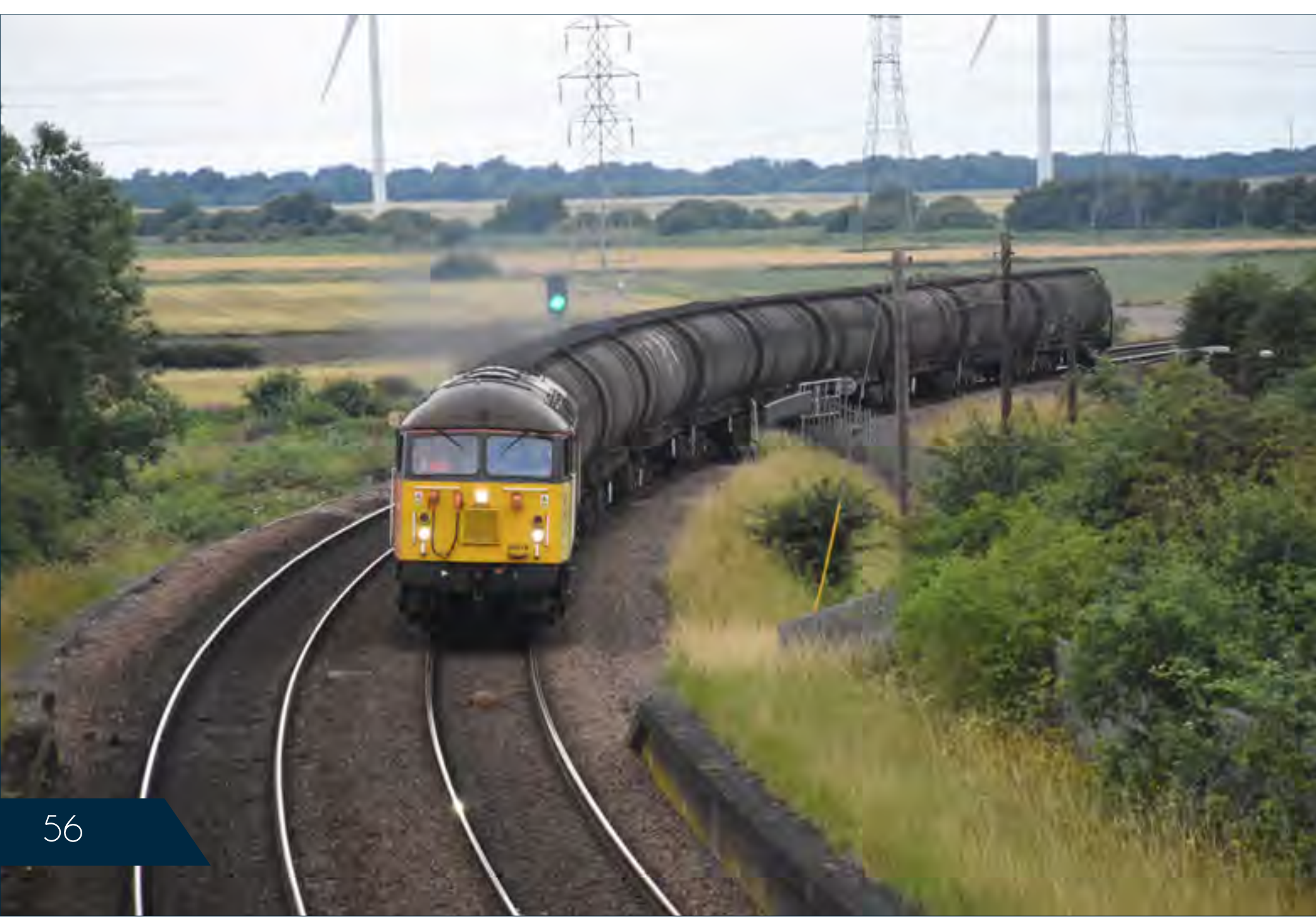
▶ On July 23rd, Class 56 105 and 56 096 on a light engine move from Up Decoy to Barnetby Sidings, pass through Scunthorpe station. Steve Thompson