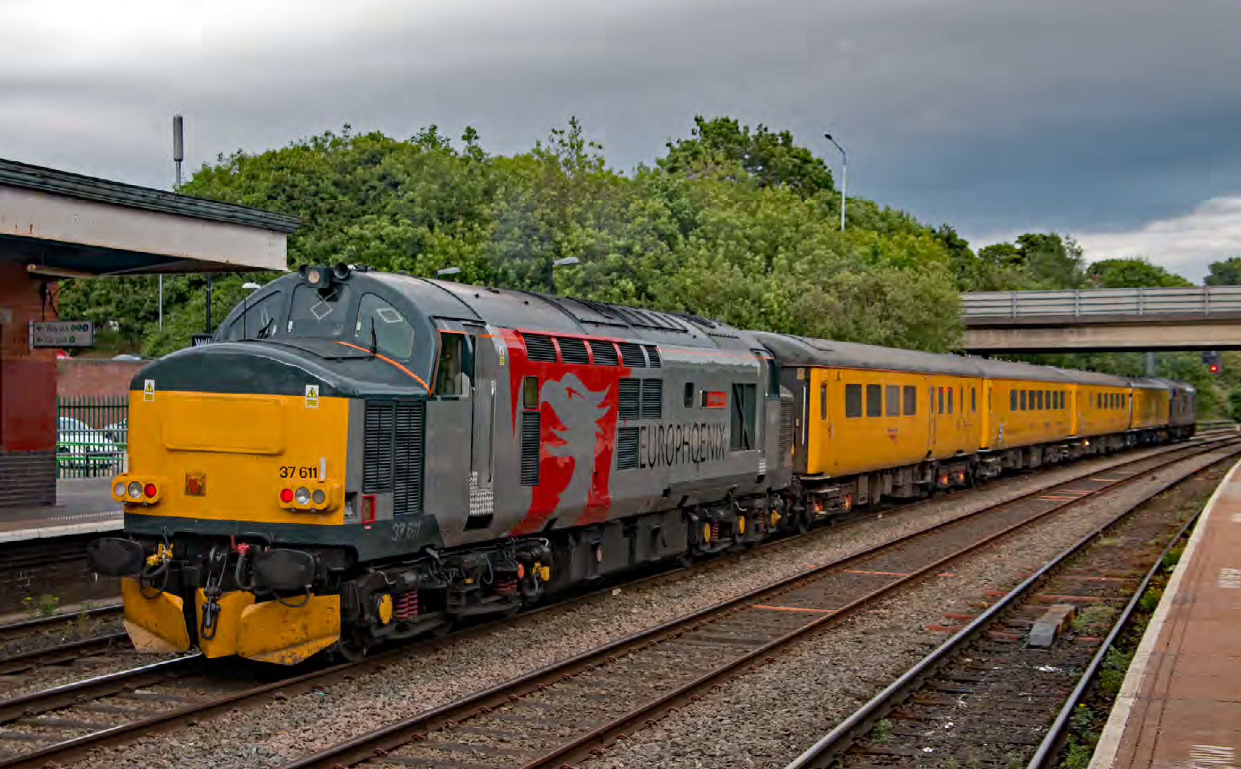
▶ Class 37 611 and 37 608 working the 1Q55 Tyseley - Derby, pause at Wellington on June 16th. Carl Grocott