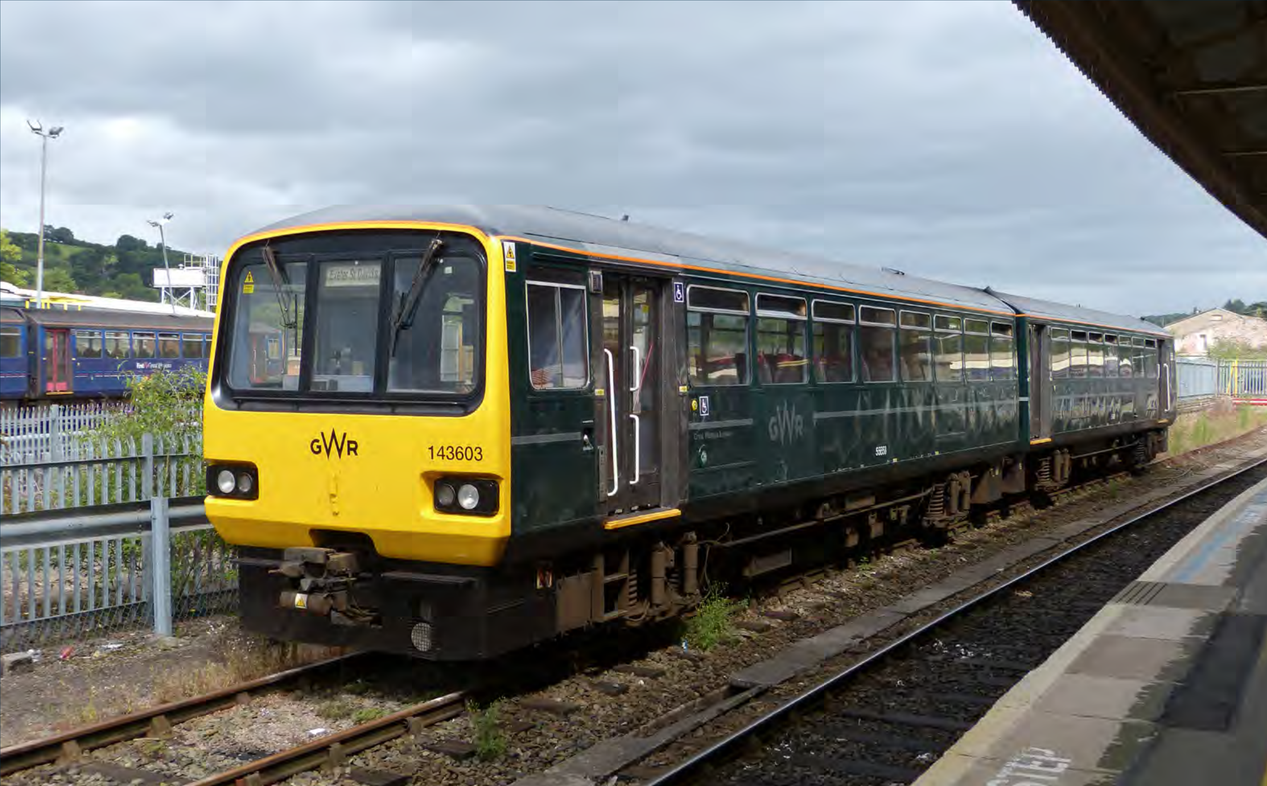
Great Western Railway's Class 143 603, now in GWR green livery, stands at Exeter St. Davids on August 3rd.