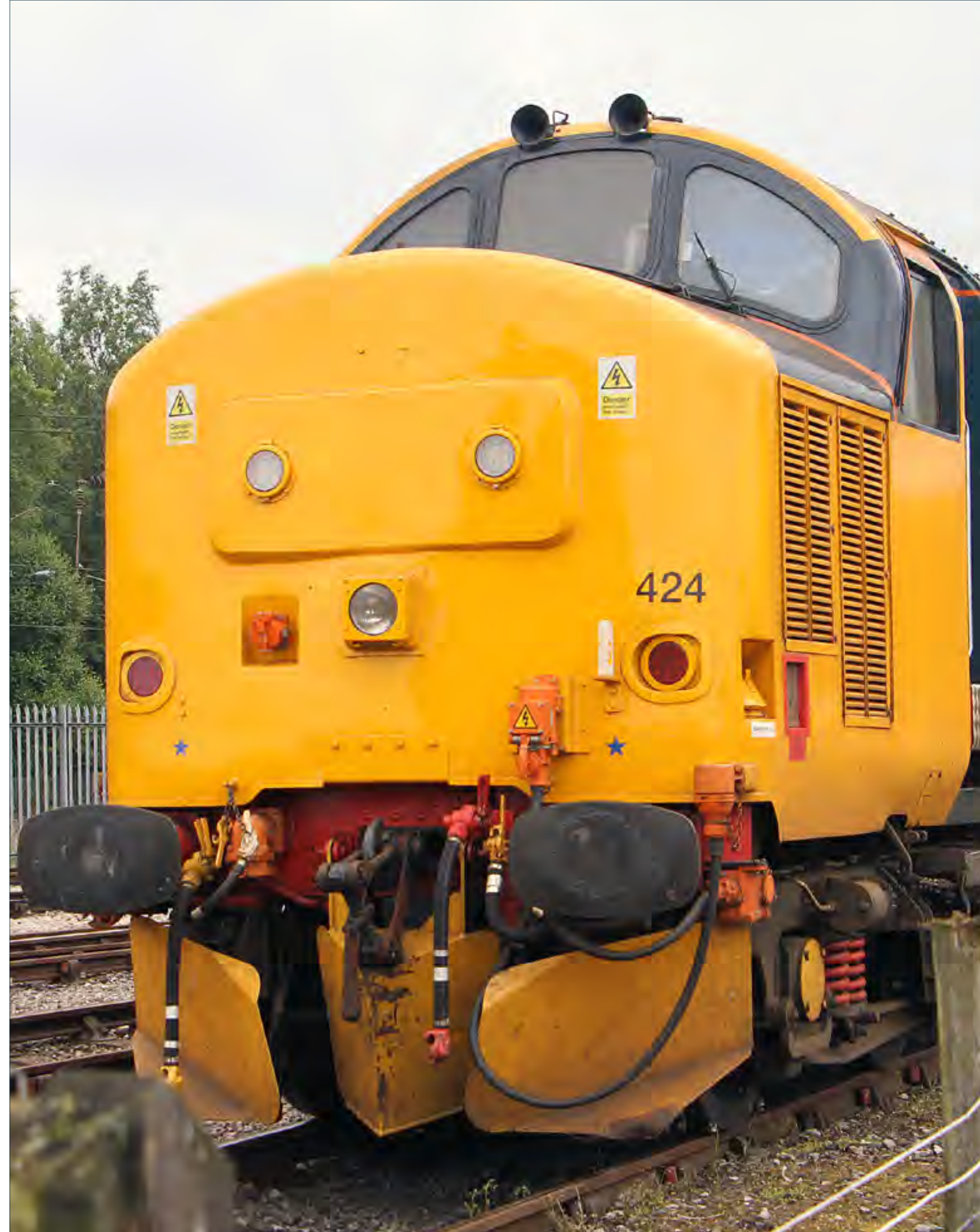
Class 37 424 'Avro Vulcan XH558' on display at the DRS open day at Kingmoor on July 22nd.