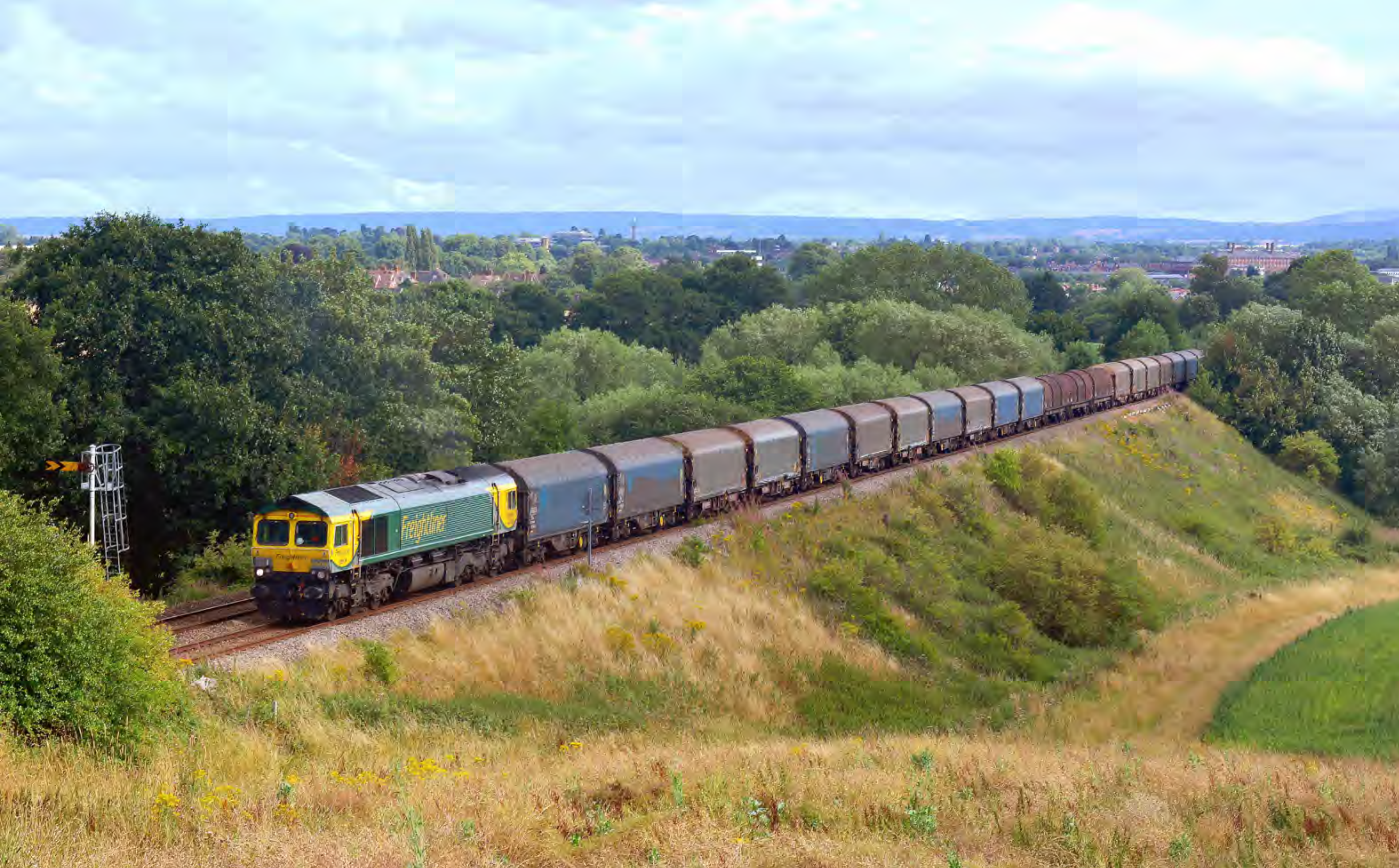
▶ Class 66 414 climbs Hencote Bank, Shrewsbury with the 6M86 10:29 Margam - Dee Marsh Recp Sidings on July 27th.