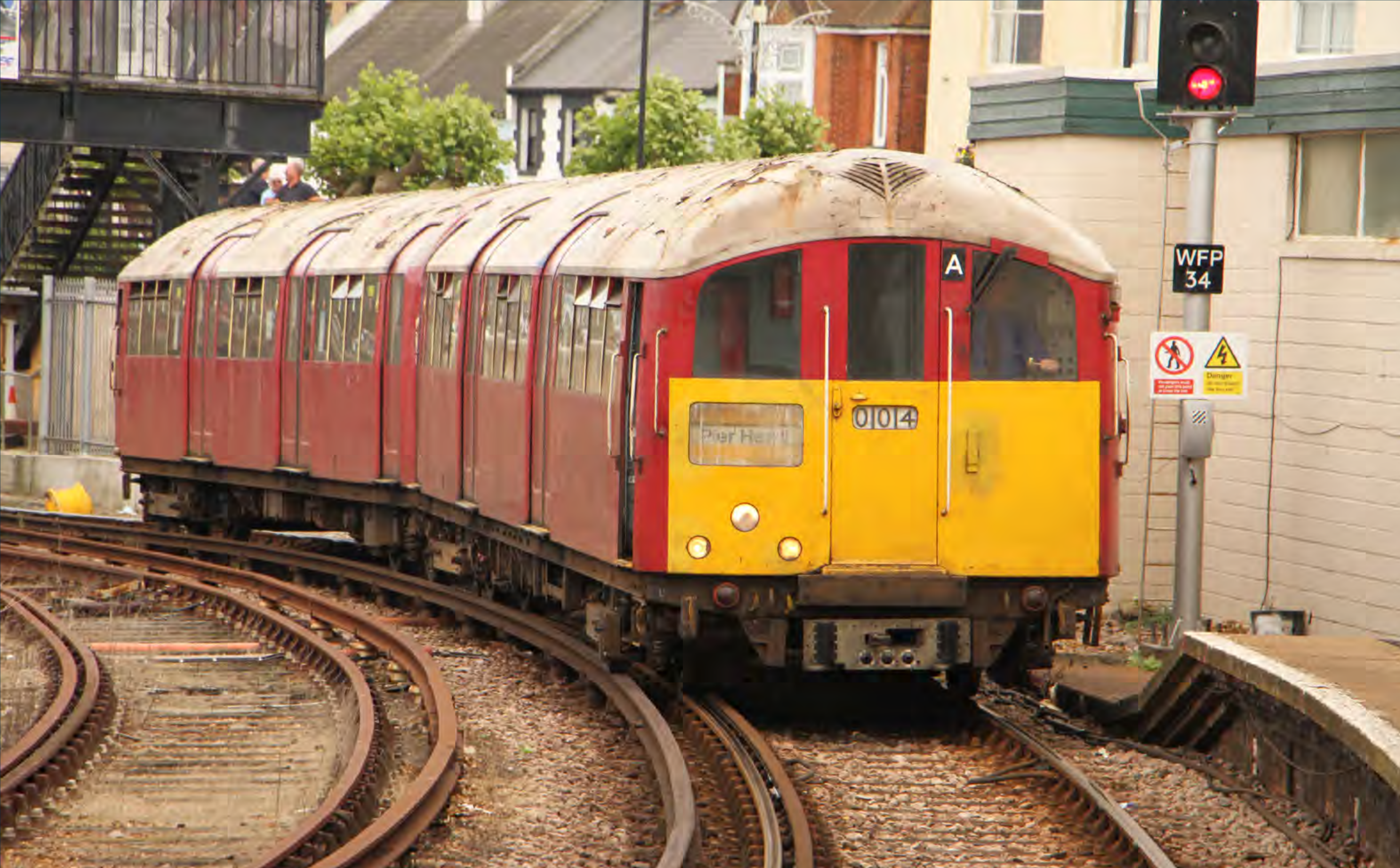
▶ Class 483 004 approaches Ryde Esplanade with the 15:40 service for Ryde Pierhead on July 1st. Derek Elston