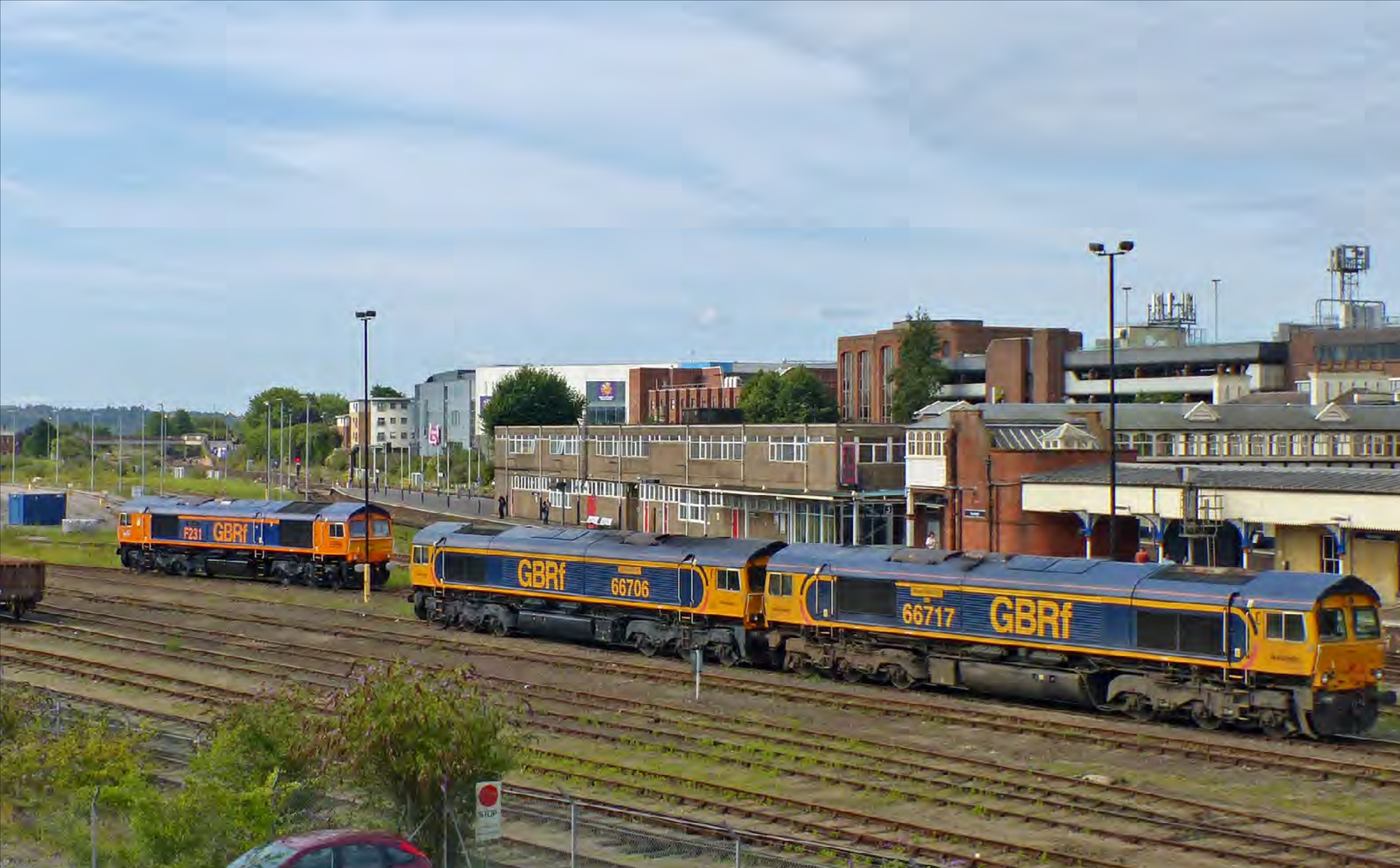
On July 13th, Class 66 717, 66 706 and celebrity 66 775 'HMS Argyll' are seen stabled at Eastleigh. Michael Lynam