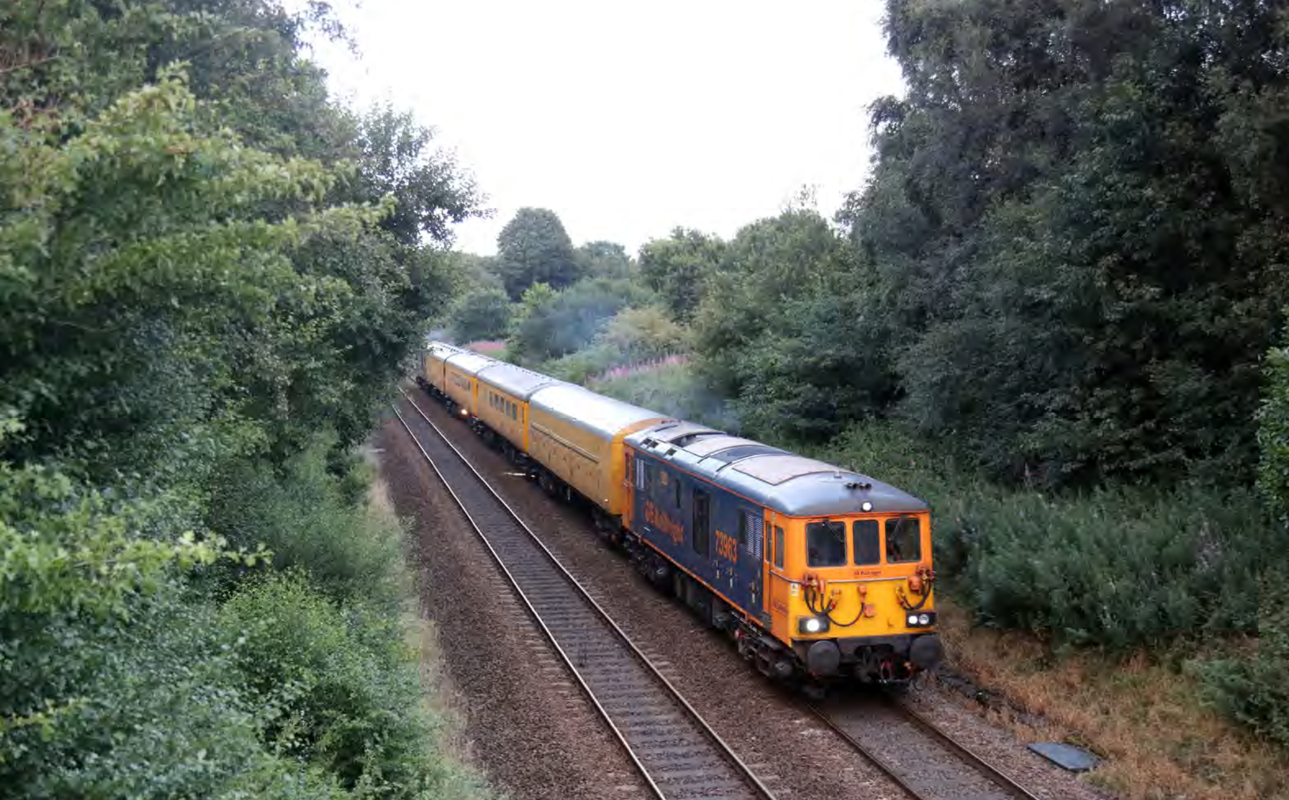
In fading light on August 3rd, GBRf's Class 73 963 tops and tails with 73 961 on a Crewe - Crewe working near Glazebrook on the former CLC line. Jeff Nicholls