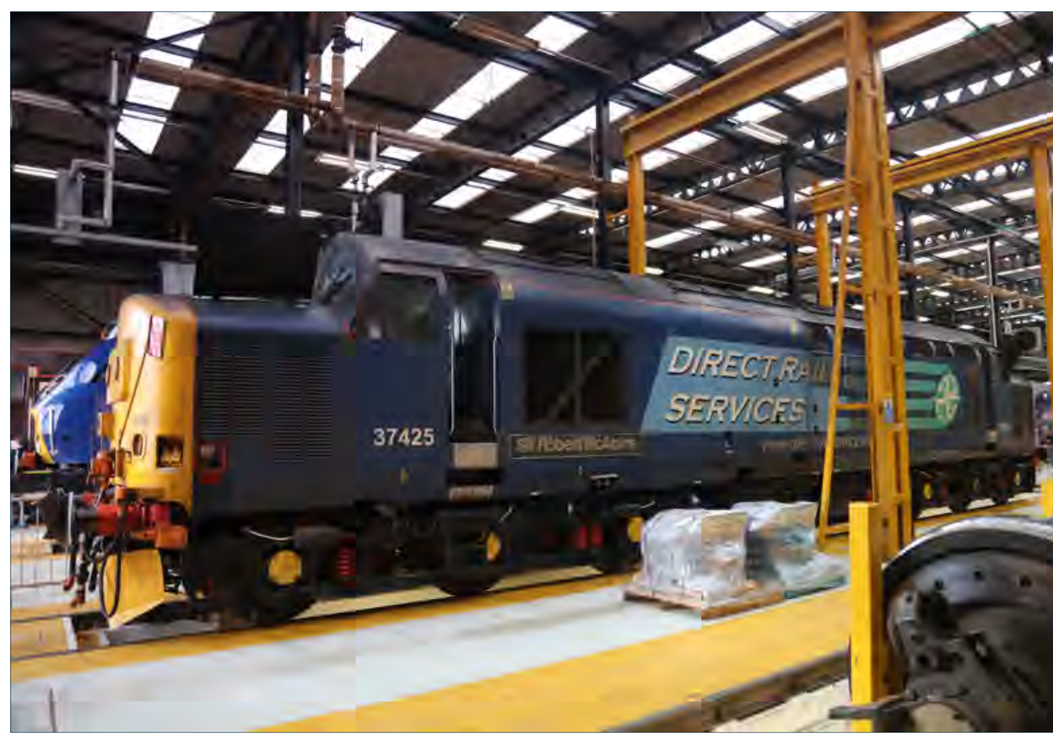
Class 37 425 'Sir Robert McAlpine/Concrete Bob' undergoes repairs inside the depot at Kingmoor.