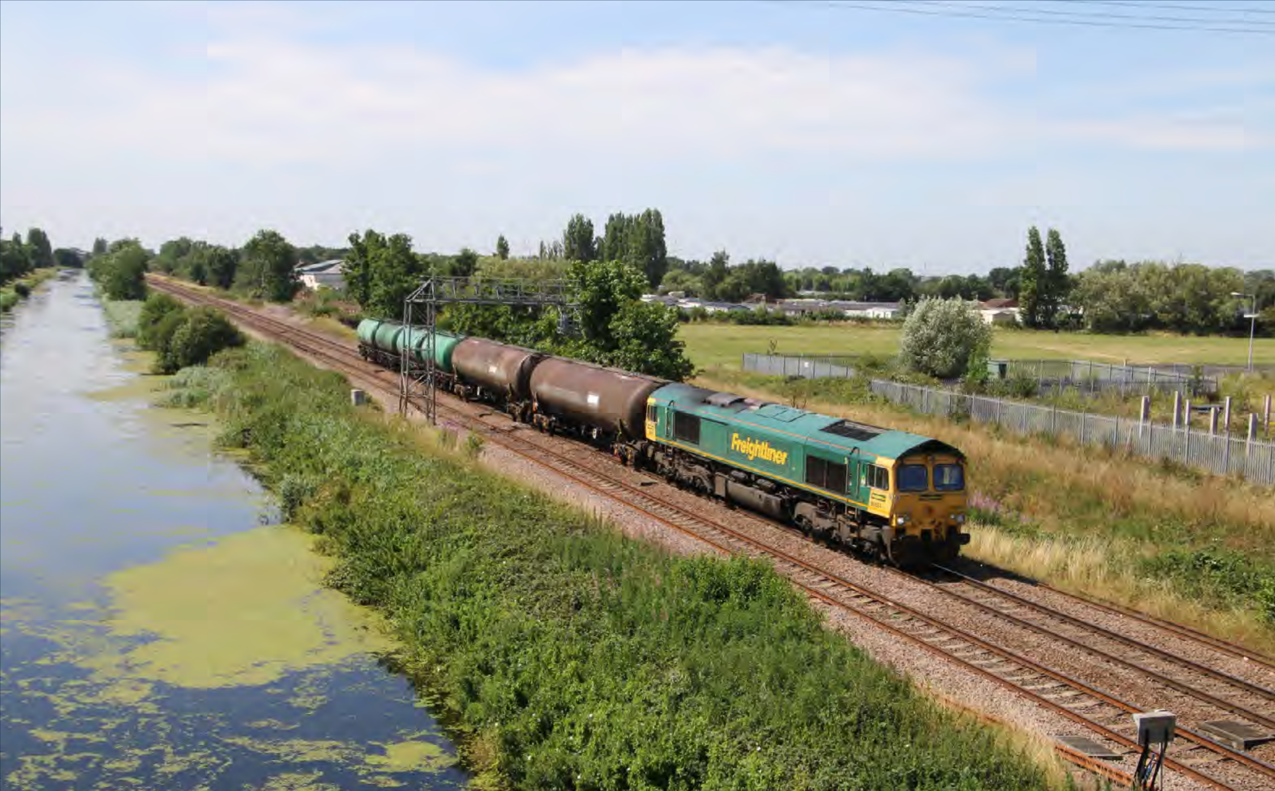
▶ Class 66 554 hauls the Ipswich - Lindsey empty fuel tanks past Crowle on July 18th. Mark Enderby