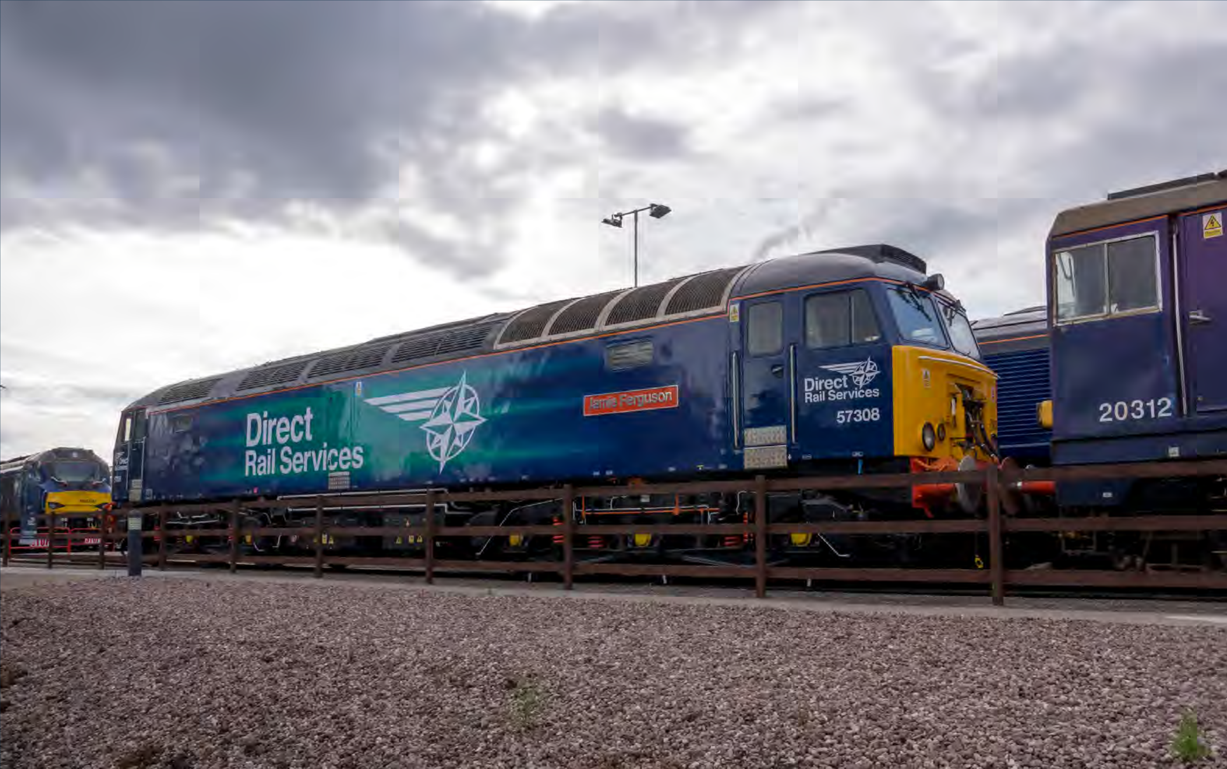
Class 57 308 is seen stabled at Crewe Gresty Bridge on July 15th. Brian Battersby