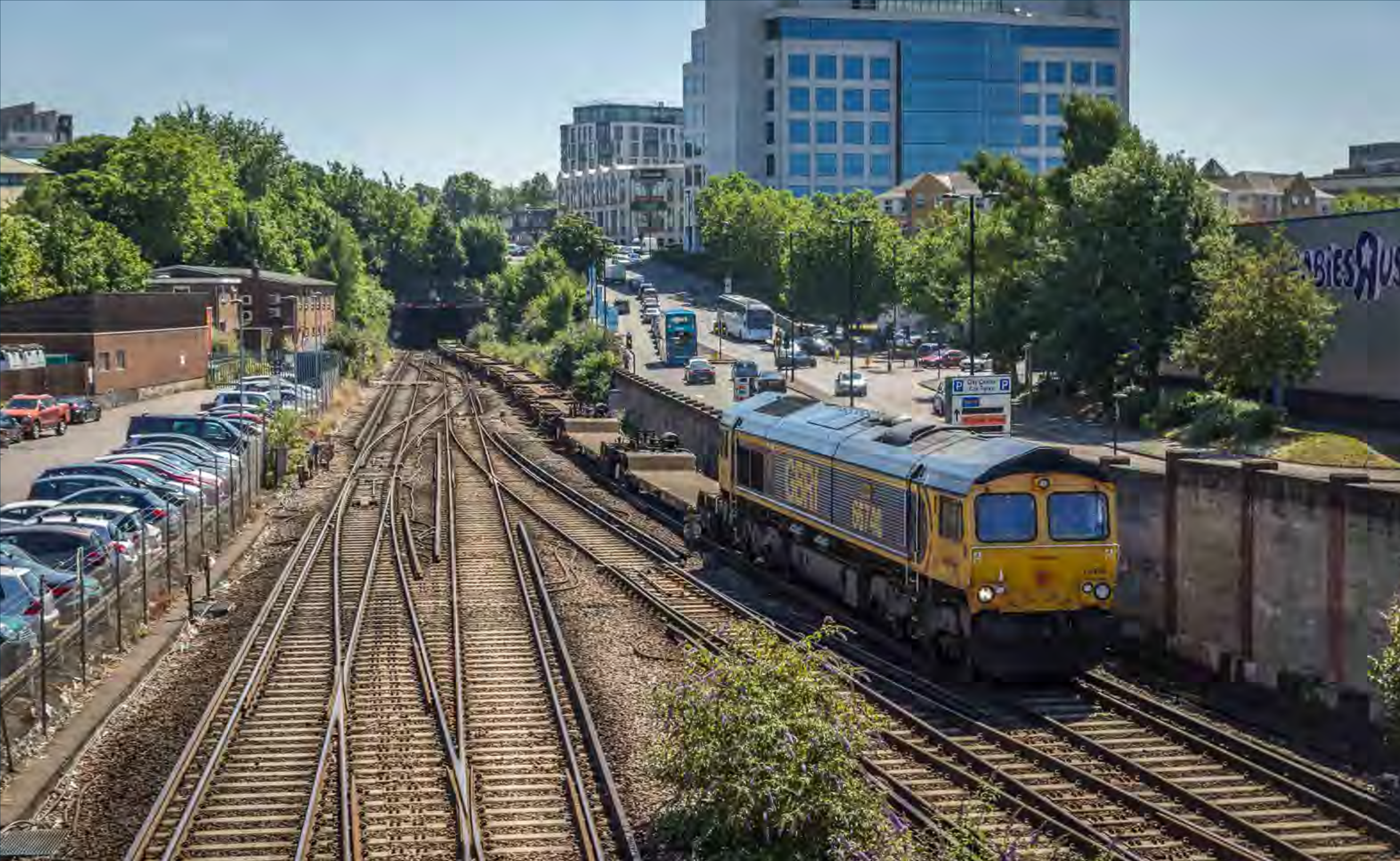
On July 5th, Class 66 740 'Sarah' with the 6045 Bicester to Marchwood is seen approaching Southampton Central.