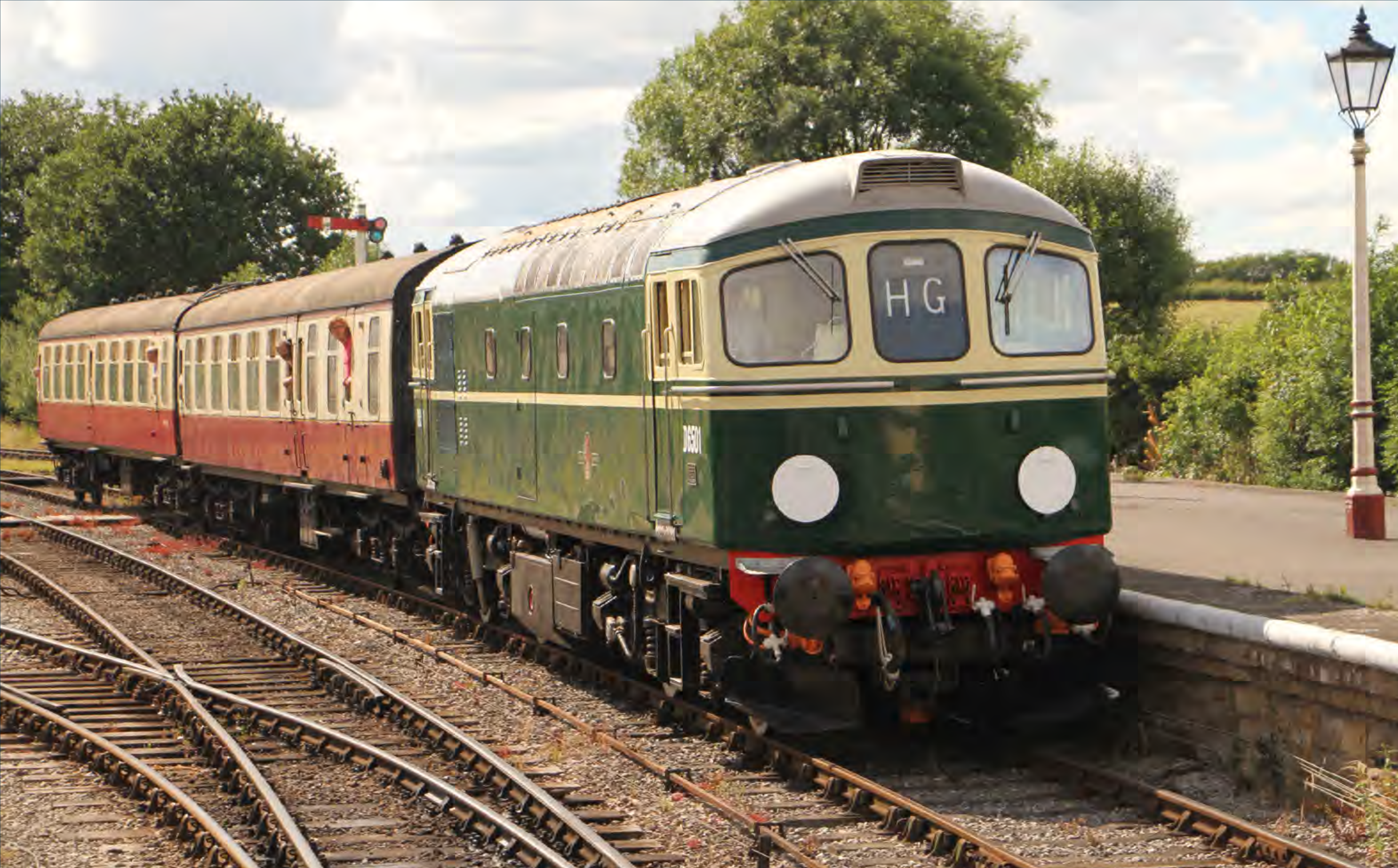
▶ Class 33 No. D6501 is photographed arriving at Swanwick Junction with the 15:28 from Hammersmith to Riddings during the 1960s event on July 9th. Derek Elston