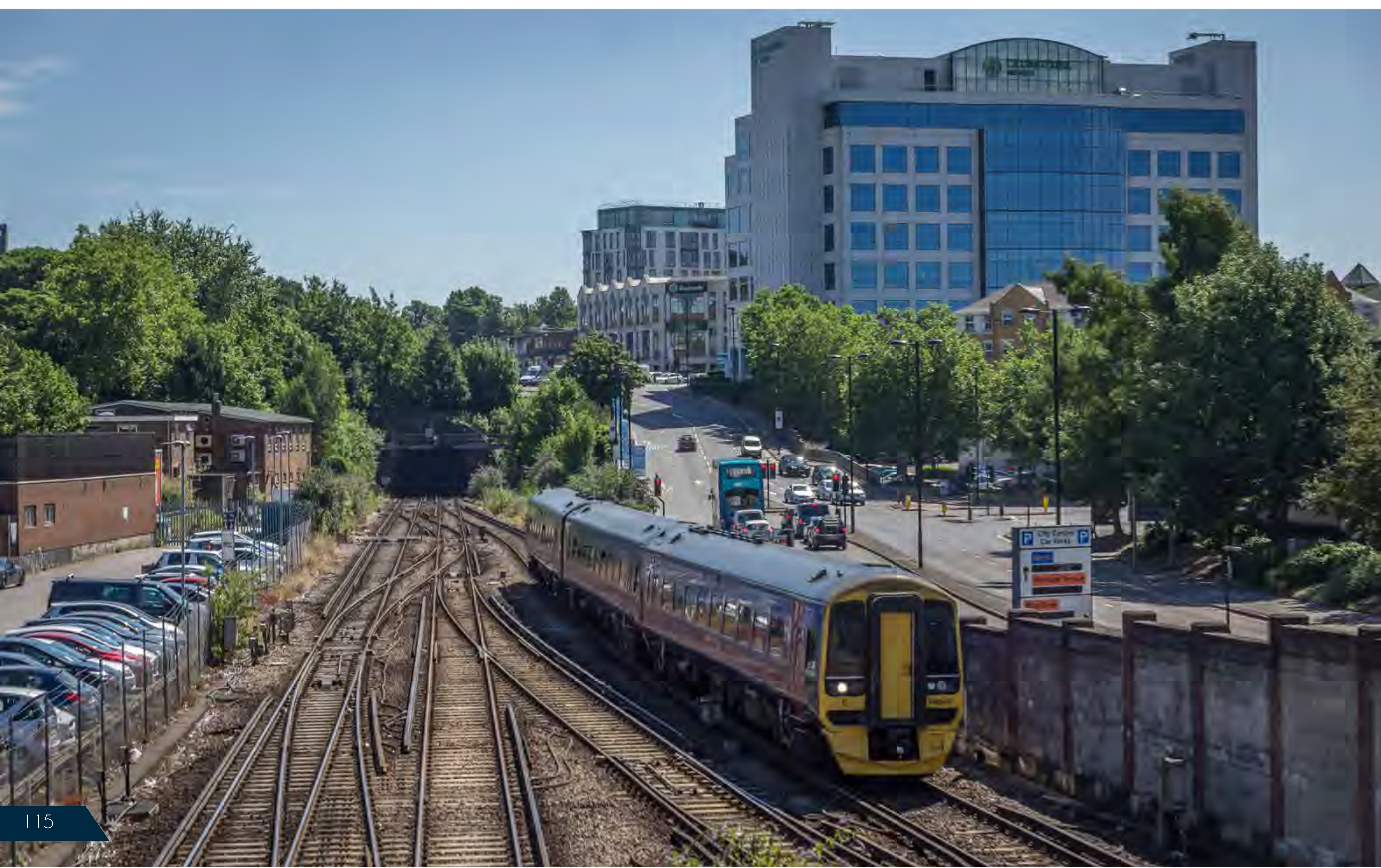
▶ Arriva Trains Wales' Class 153 362 arrives at Crewe having worked as 2K58, the 14:24 from Shrewsbury, July 5th.