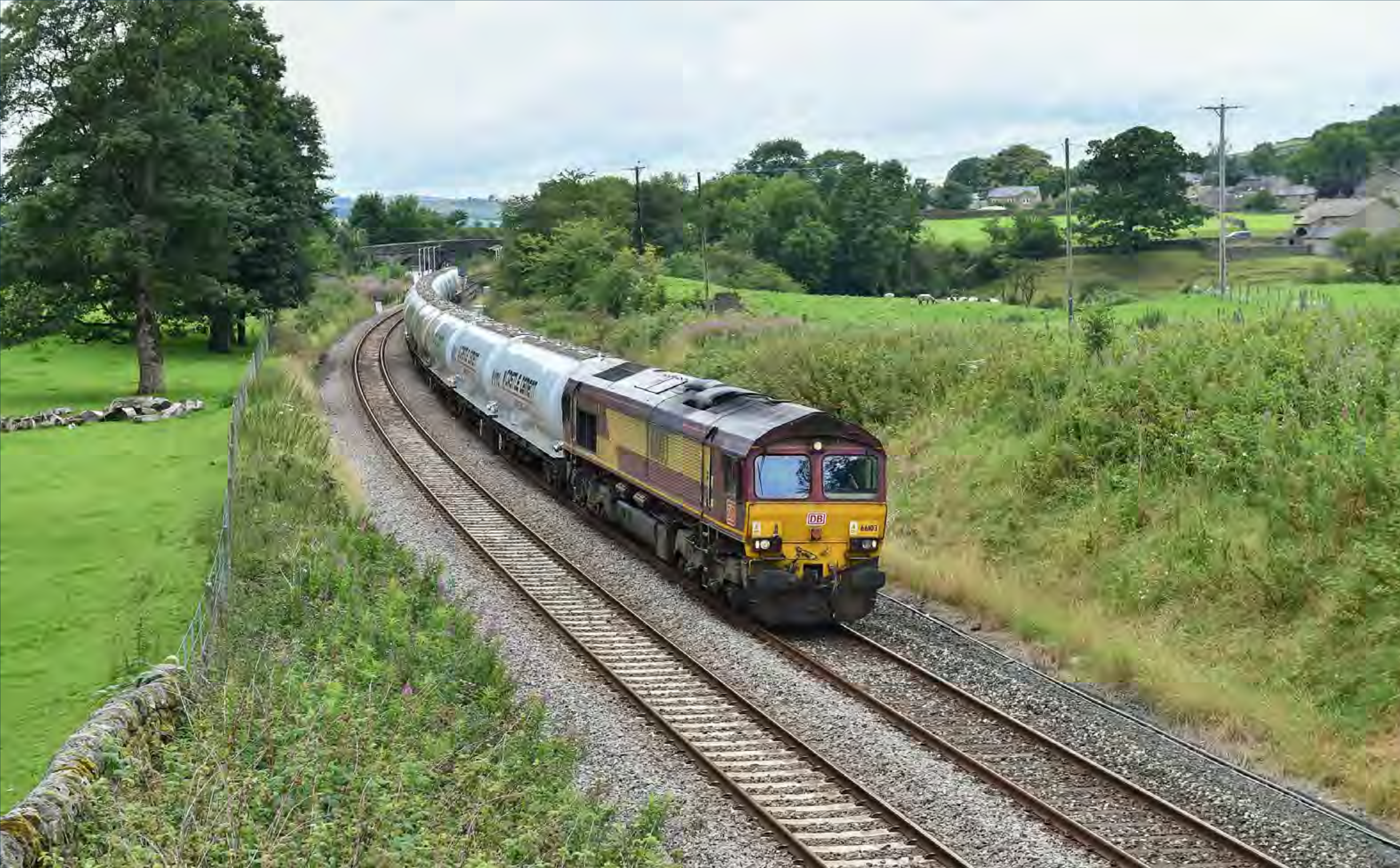
▶ Class 66 103 leading the 4M00 Mossend to Clitheroe, passes Long Preston on August 2nd.