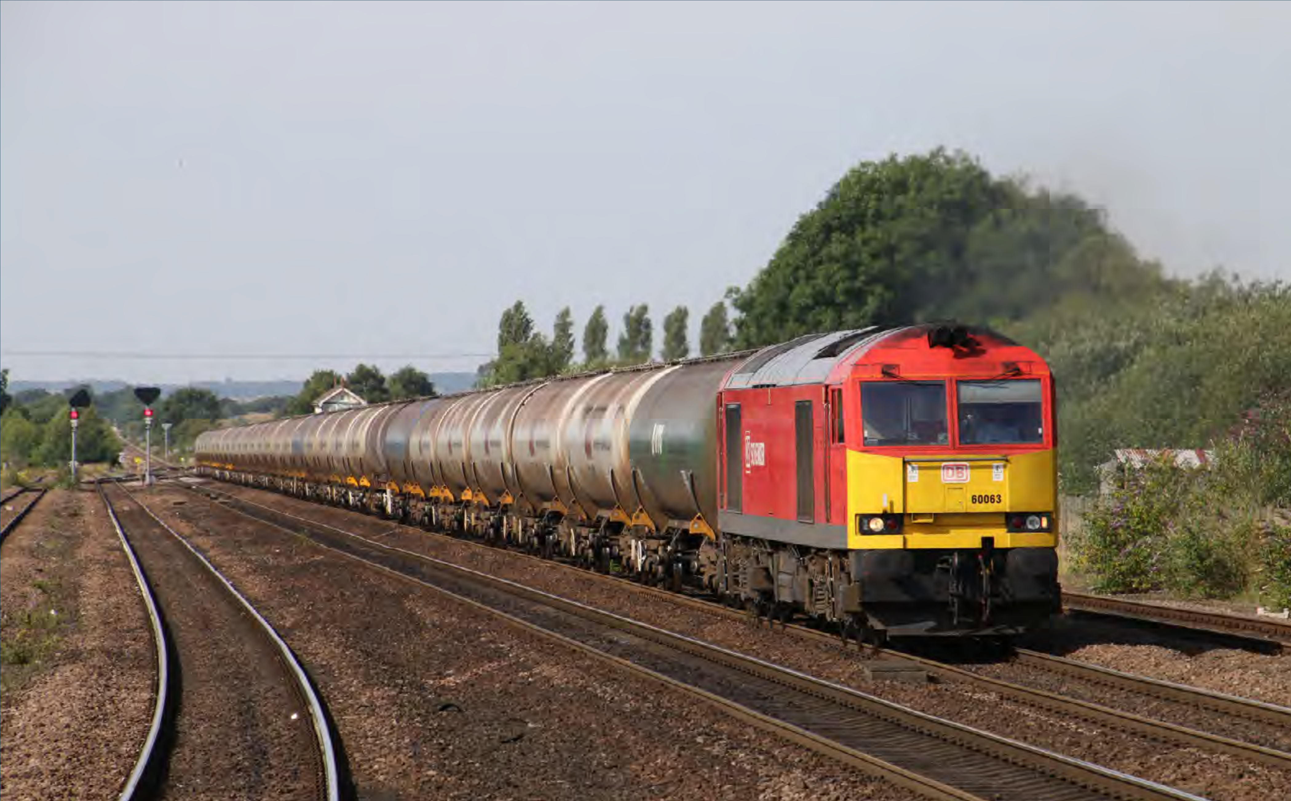
On July 18th, Class 60 063 approaches Barnetby with the Kingsbury-Lindsey tanks.