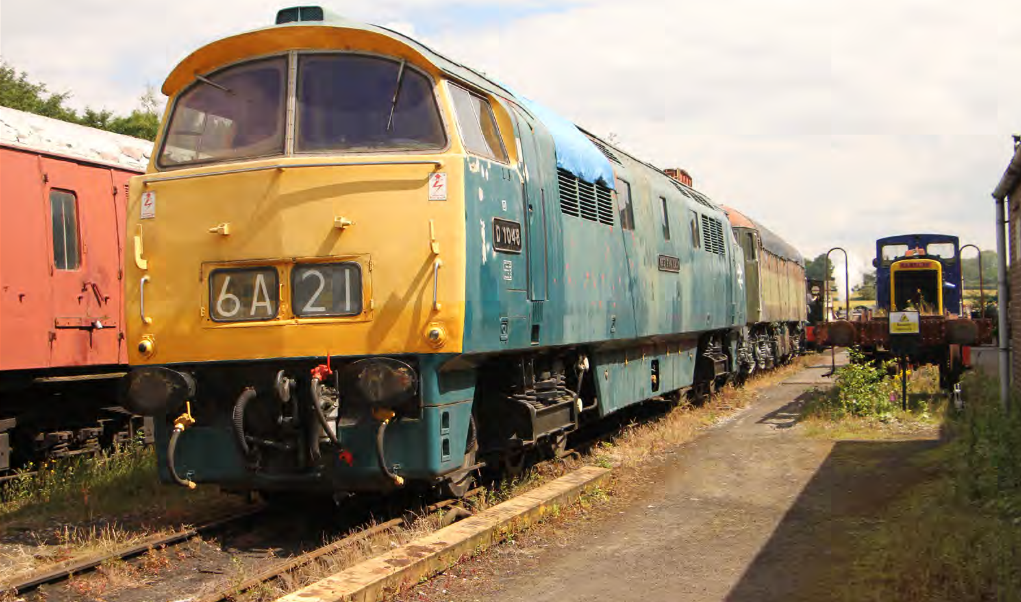
Western Class 52 No. D1048 'Western Lady' in the yard at Swanwick on July 9th. Derek Elston