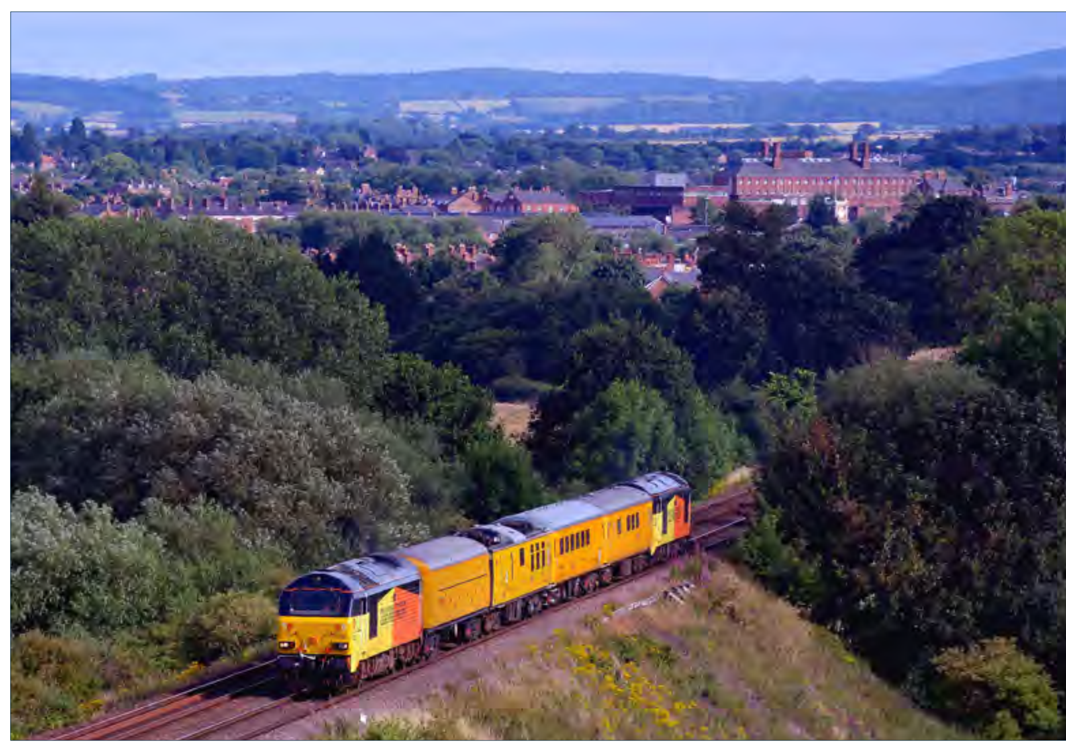
▶ On July 11th, having toured the outer reaches of North Lincolnshire, the "Yellow Peril", Class 950001, heads back to Doncaster, it's dreadwork done! Steve Thompson