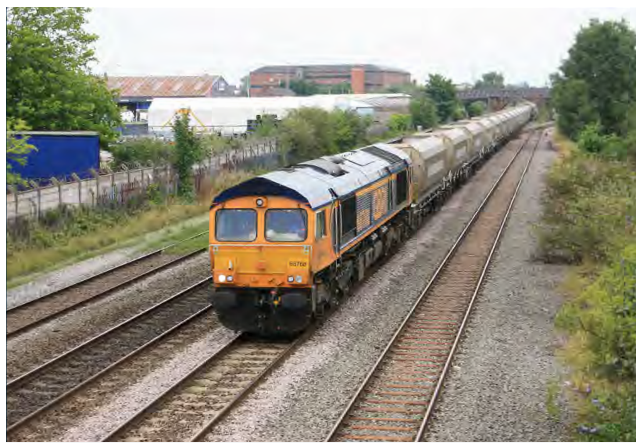
Class 66 768 (replacing the usual 59 003) hauls the 6M83 Tinsley - Bardon Hill empty stone hoppers through Burton on July 25th.