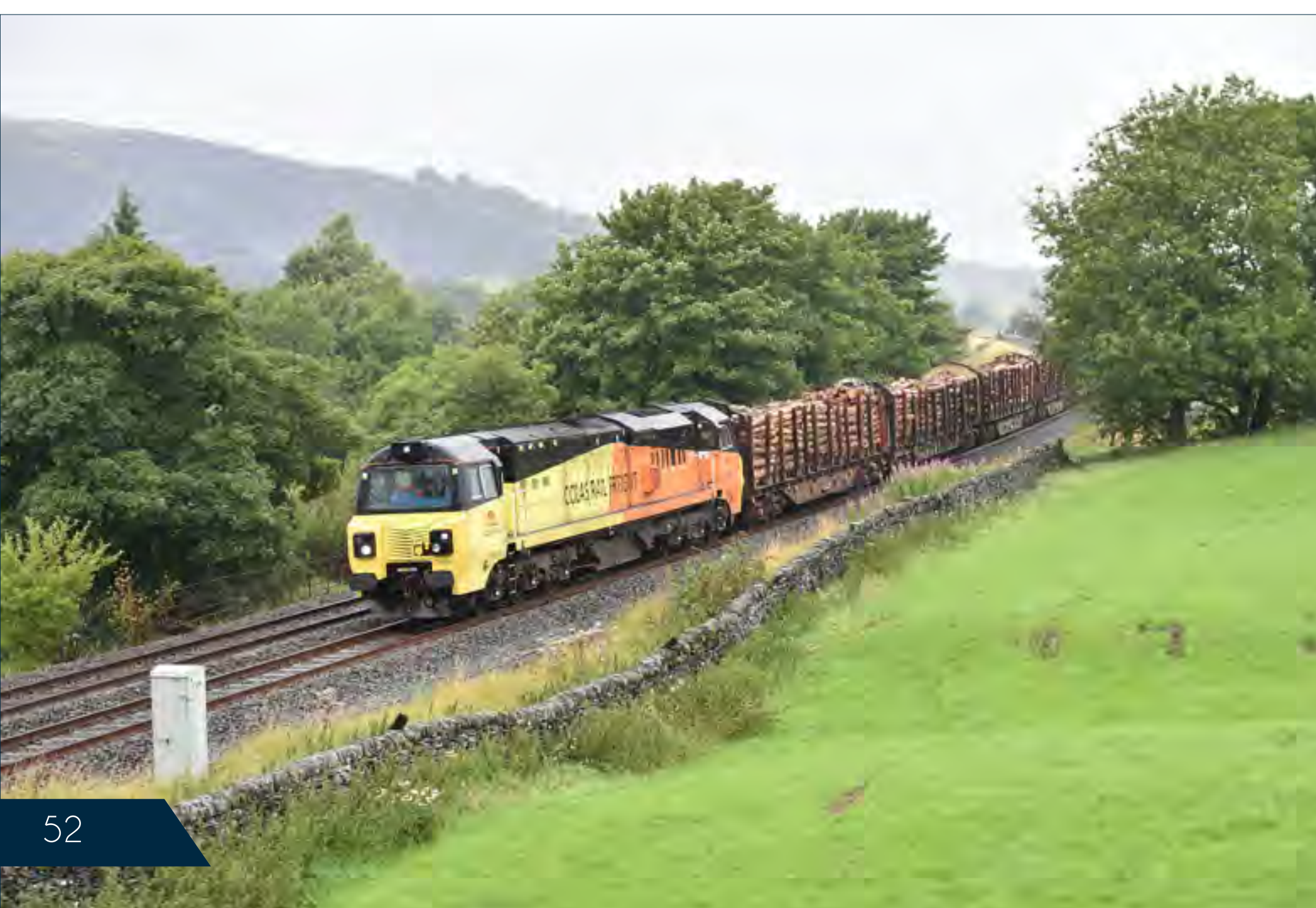
▶ Class 60 026 passes Pipers Ash on July 3rd with a Chirk bound log train. Brian Battersby