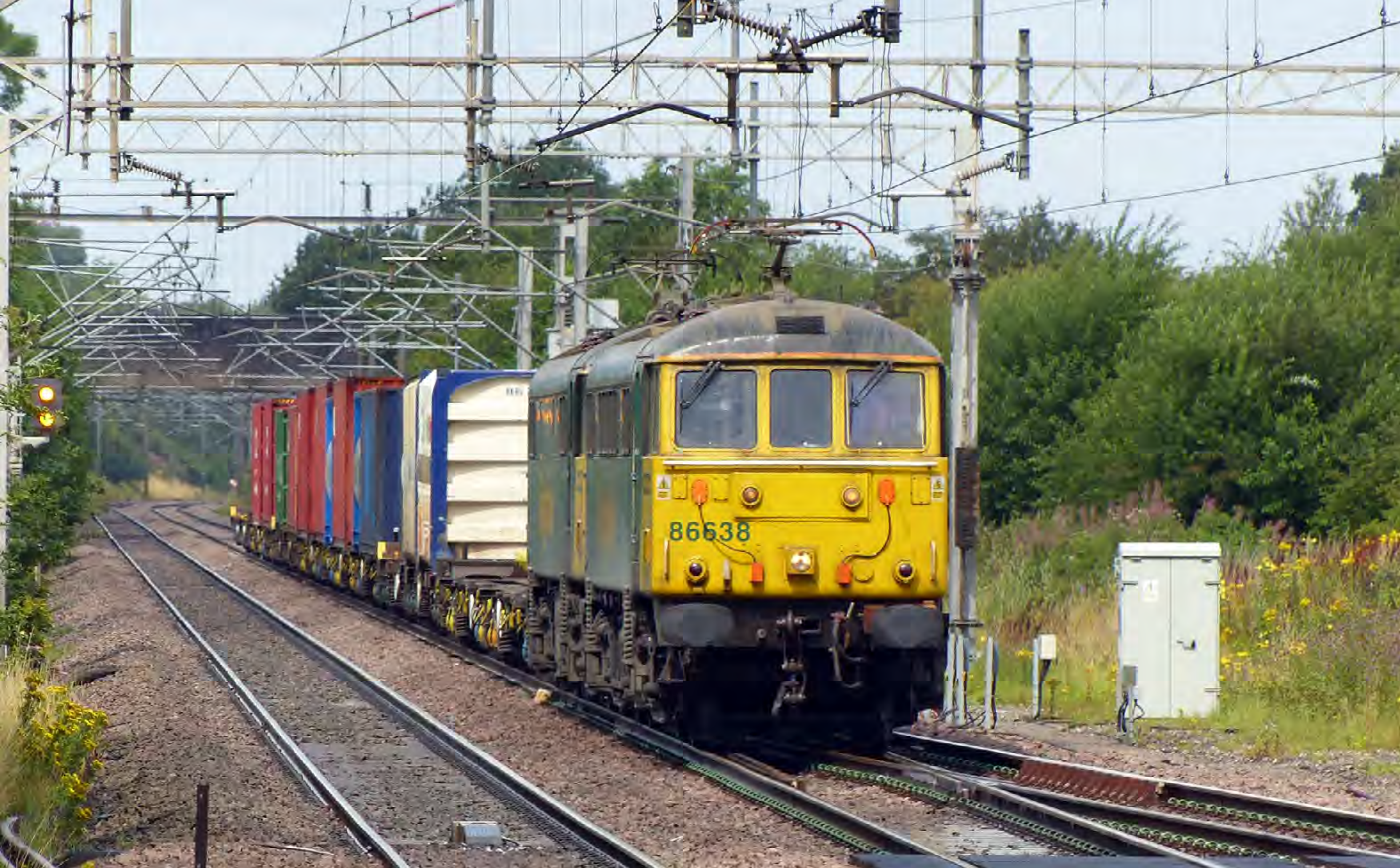
On July 27th, Class 86 638 and 86 608 head a Garston FLT - Crewe Basford Hall liner south through Acton Bridge.