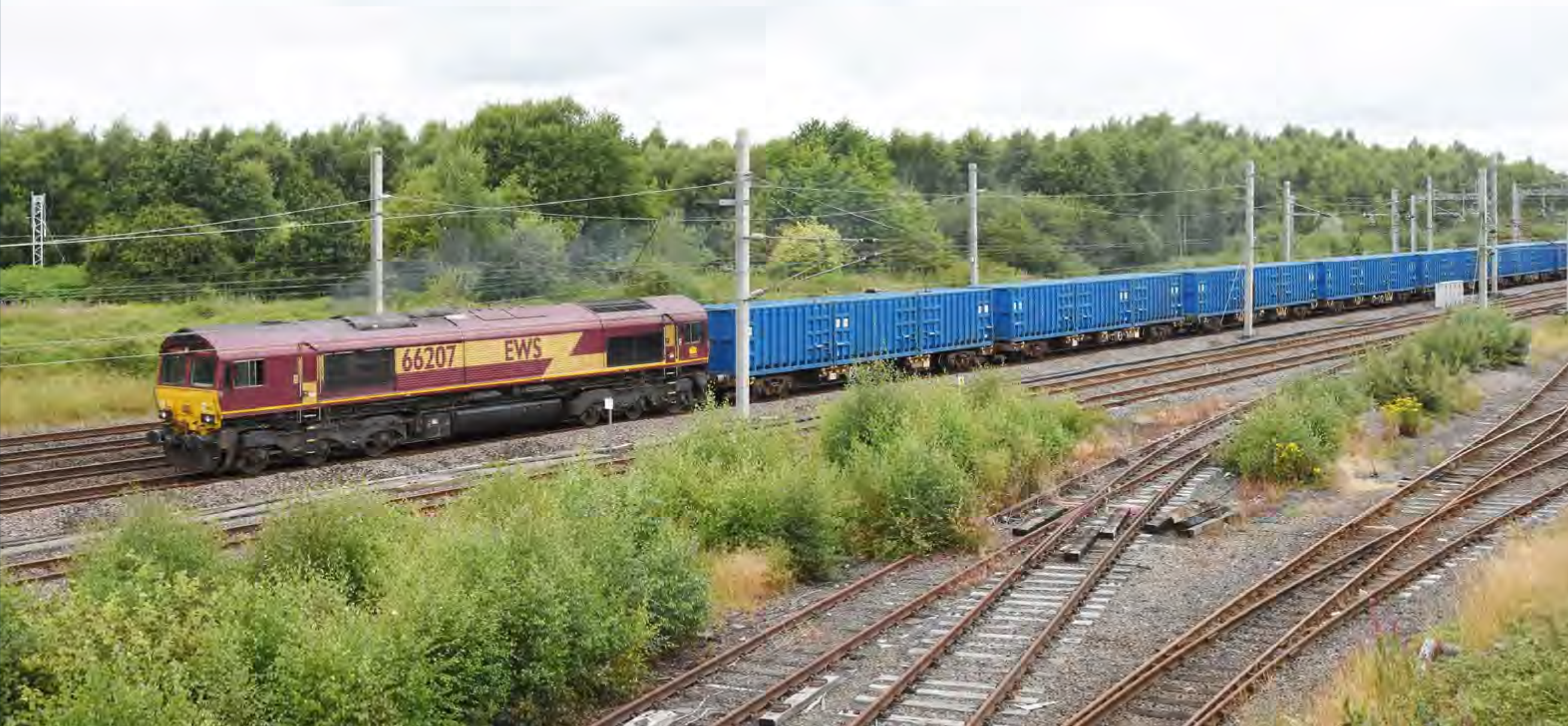
Class 66 207 passes Springs Branch with the Knowsley - Wilton bin liner on July 20th.