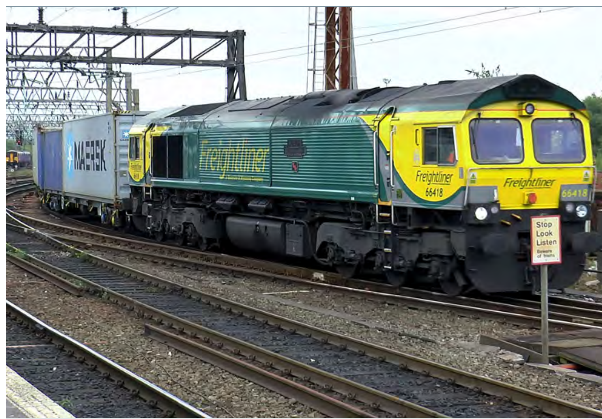
▶ Pictured hauling a Crewe to Trafford Park liner through Manchester Piccadilly on August 14th is Class 66 418.