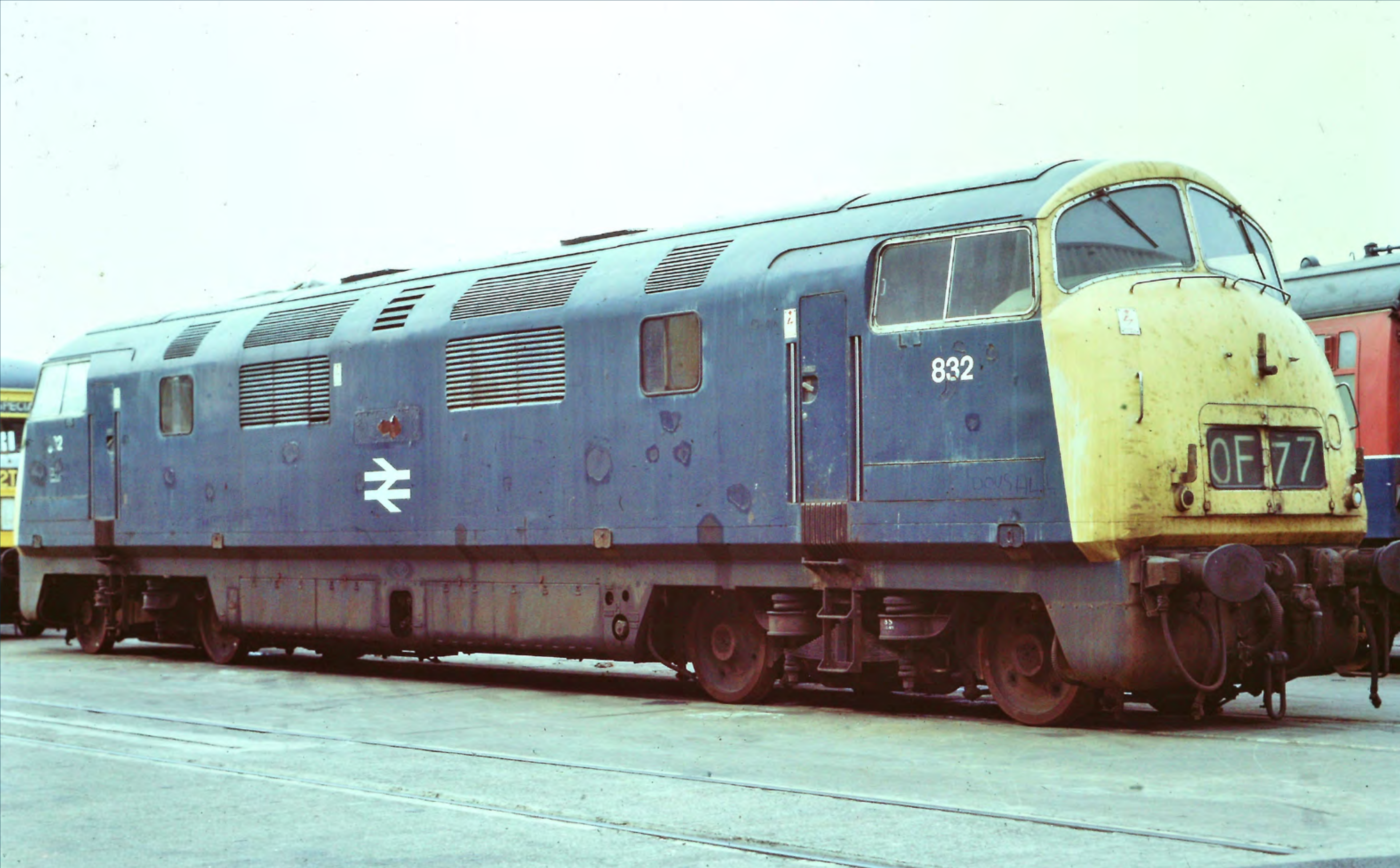
Warship Class 42 No. 832 is seen at Derby Research Centre on June 16th 1973.