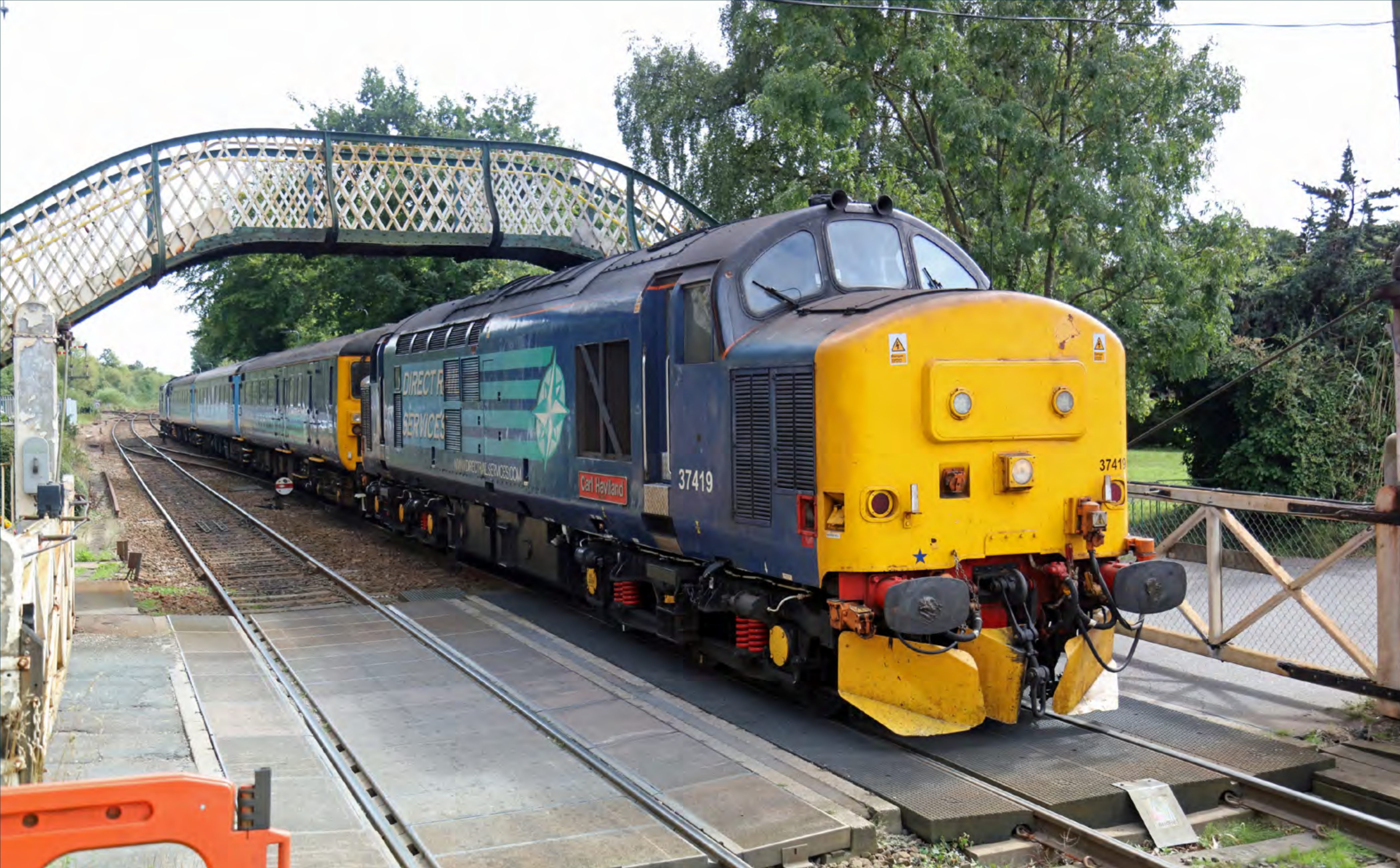
Class 37 419 and 37 405 depart Brundall with a service for Norwich.