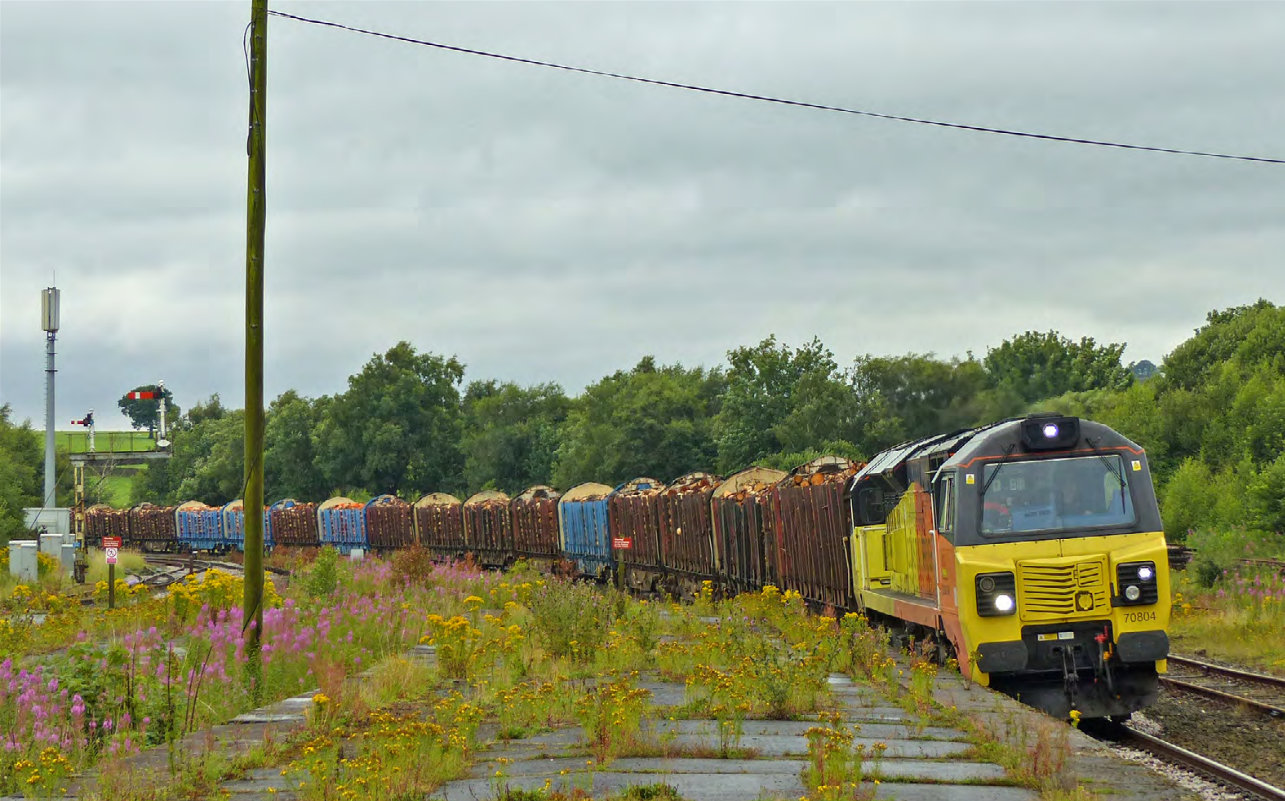
▶ Class 70 804 passes through Hellfield on August 2nd with a Carlisle - Chirk log train.