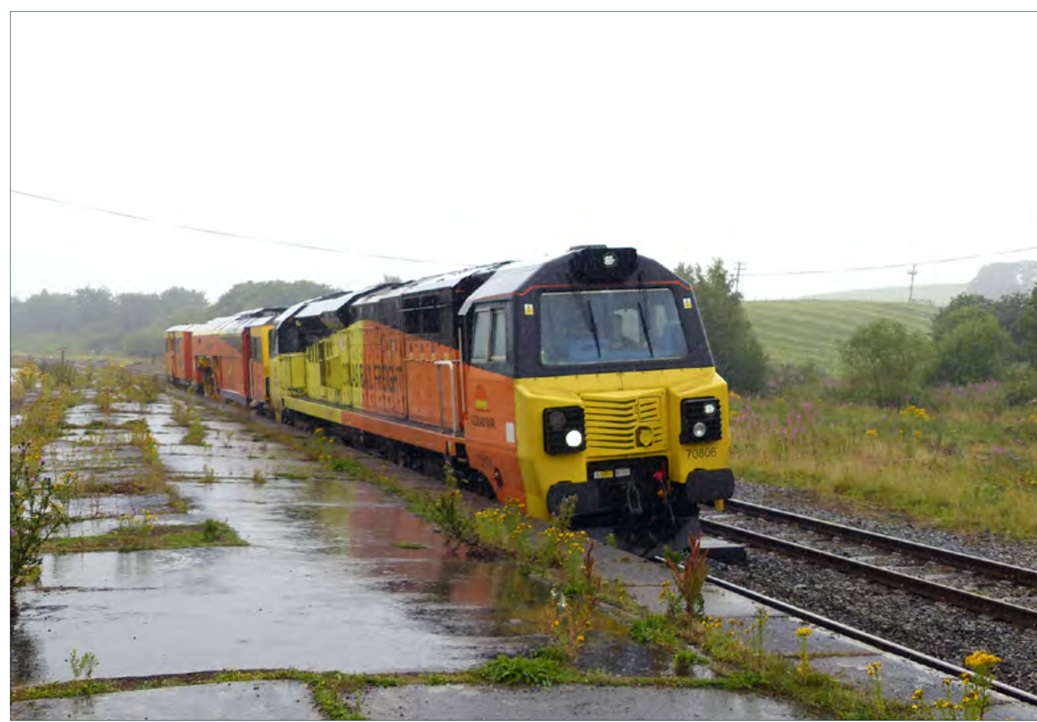
▶ On August 1st, Class 70 804 and 70 806 approach Carlisle running light engine from Bescot to Carlisle N.Y.