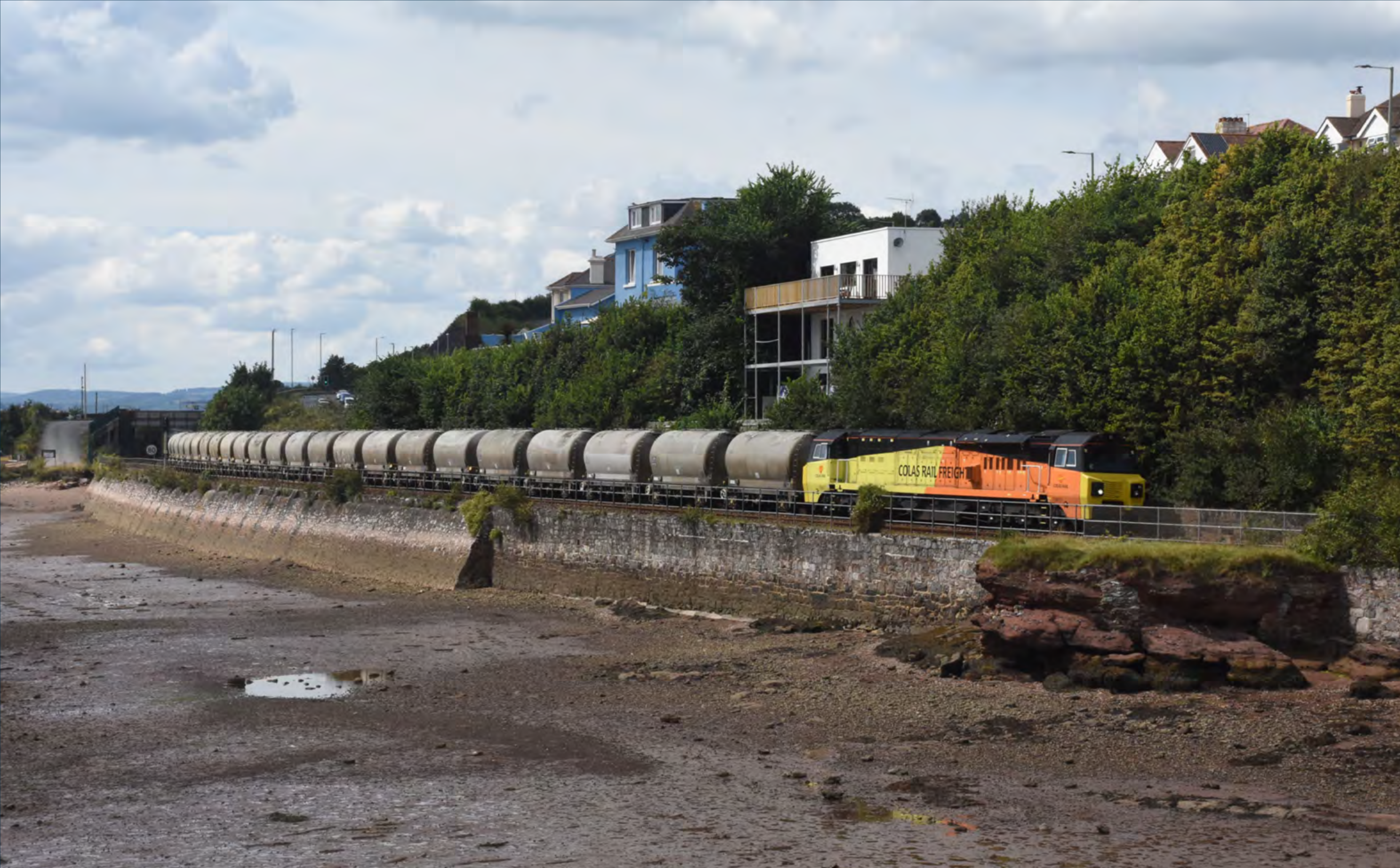
▶ Class 70 817 leads the 6C36 Moorswater - Aberthaw cement empties, viewed from Sheldon Bridge, Teignmouth on August 10th.