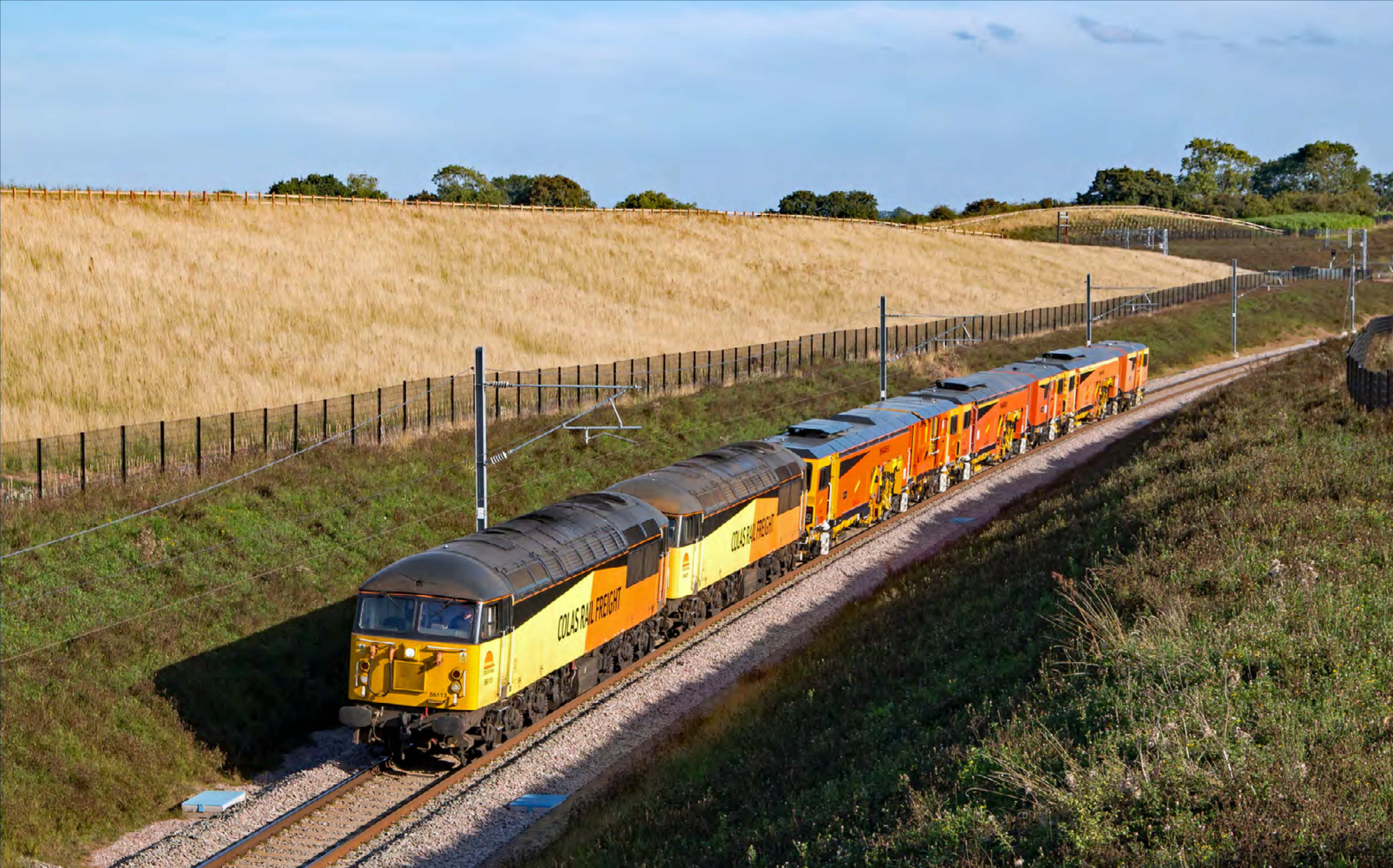
Class 56 113 and 56 087 work the 6Z56 Bletchley - Guide Bridge, seen here passing Searchlight Lane Jct. on August 28th. Carl Grocott