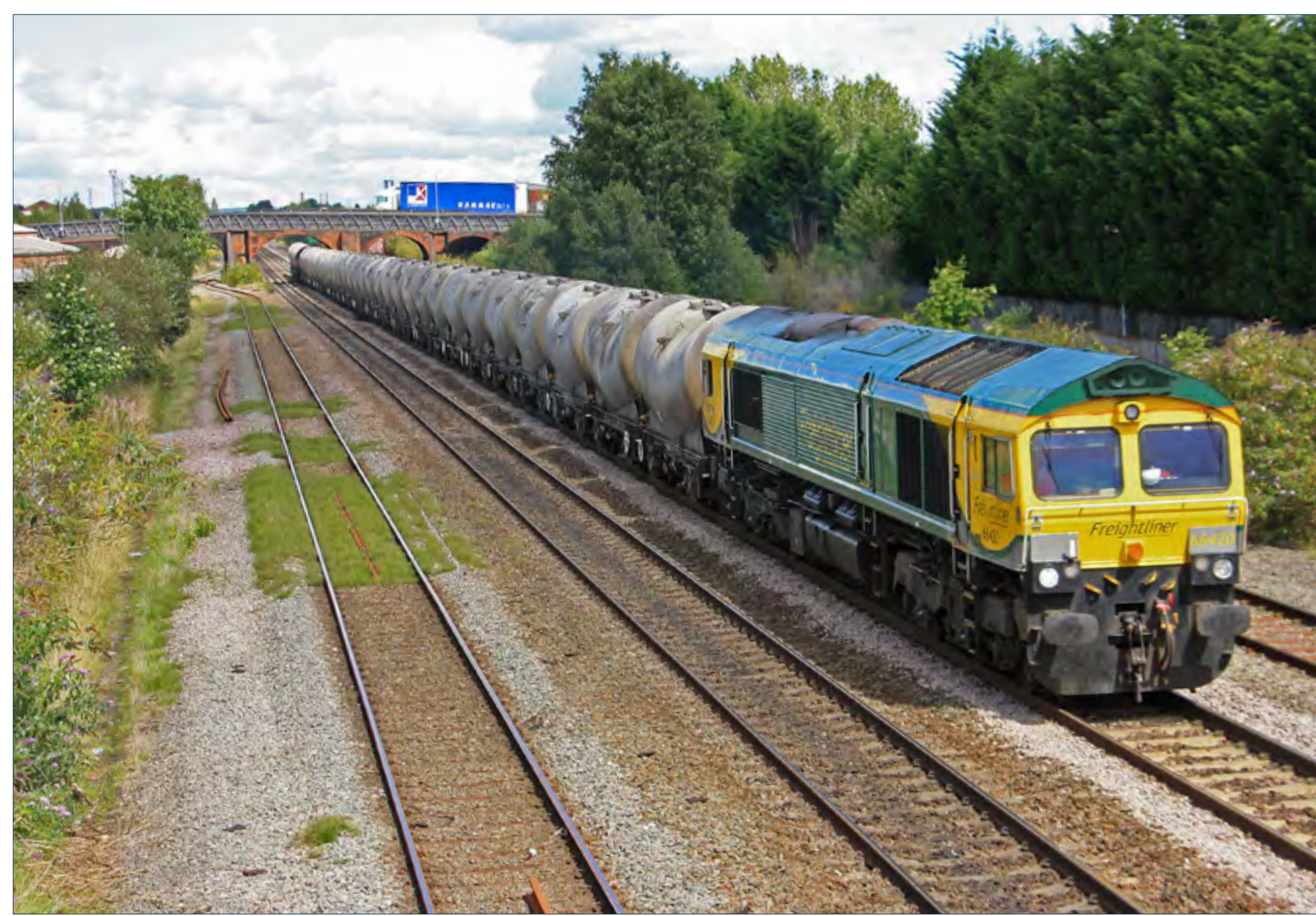
Coal deliveries to Fiddlers Ferry from Portbury have recommenced. Class 66 561 is seen amidst the wild flowers at Hall Nook Crossing shortly after leaving the power station on August 30th with empties for East Usk Yard. Jeff Nicholls