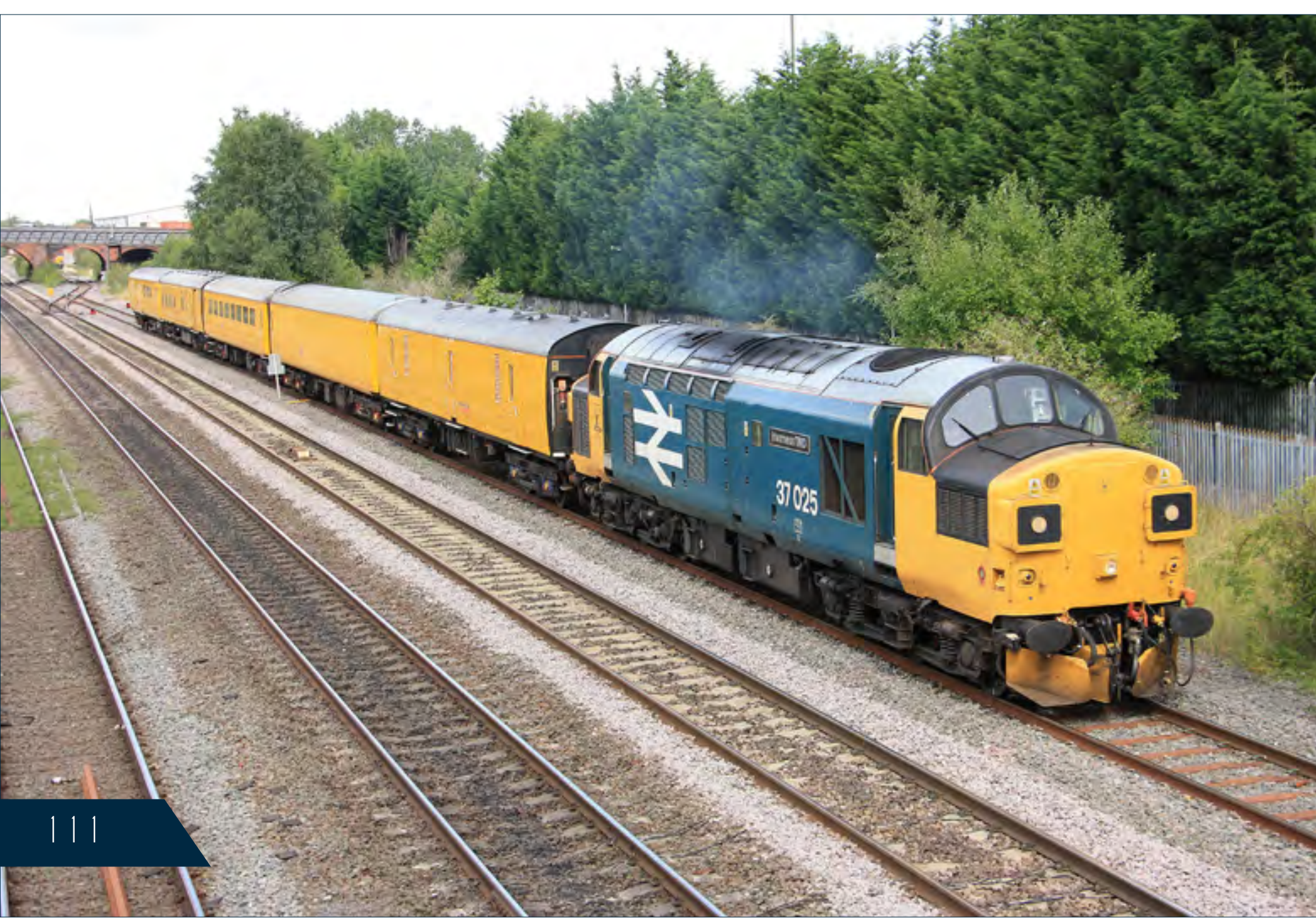
▶ On August 16th, Class 37 025 arrives into Lincoln on the rear of a test train from Derby - Immingham via 'Lincolnshire' with DBSO No. 9701 leading. Michael Lynam