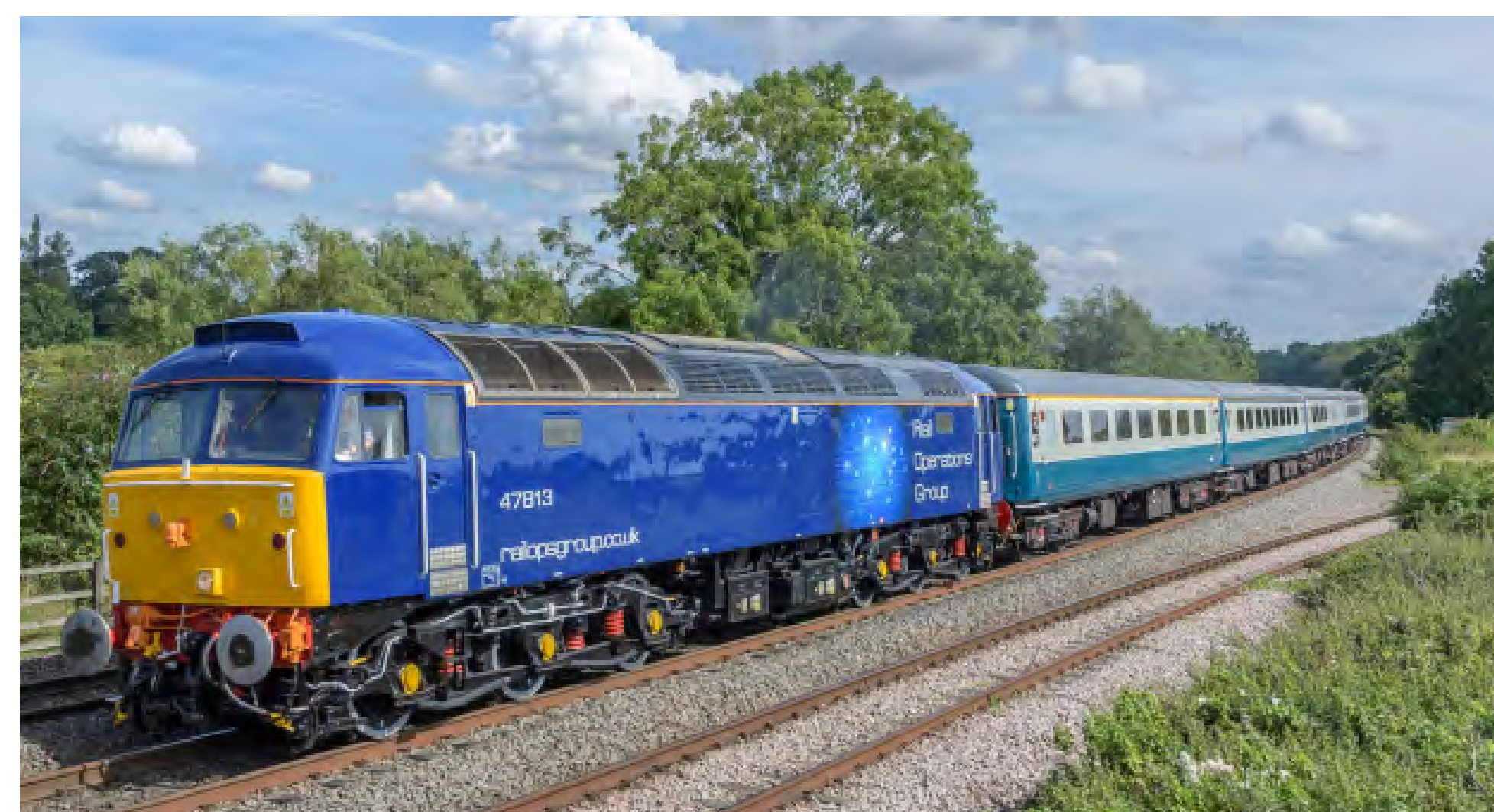
Photo shows ROG’s class 47 locomotive 47813 at the head of 1R92, the 12.53 London Marylebone to Birmingham Moor Street service on Saturday 26 August.

Rail Operations Group are developing plans to separate passenger operations from its core business.