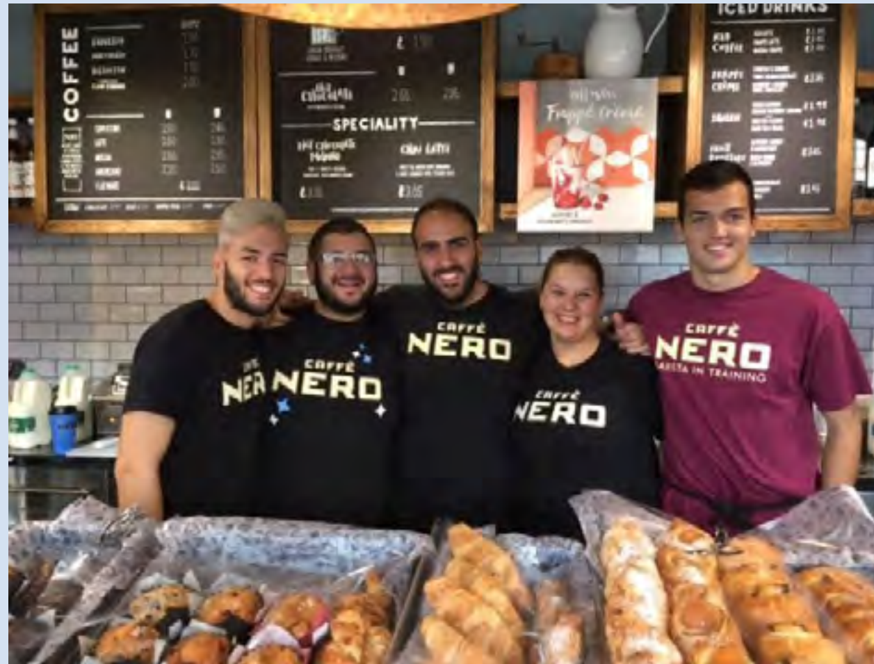
East Croydon station is welcoming a new Nero Express coffee bar.

This month just a brief announcement from our friends at Thameslink/Southern Railway who have let us know that a Nero Express has opened at East Croydon.