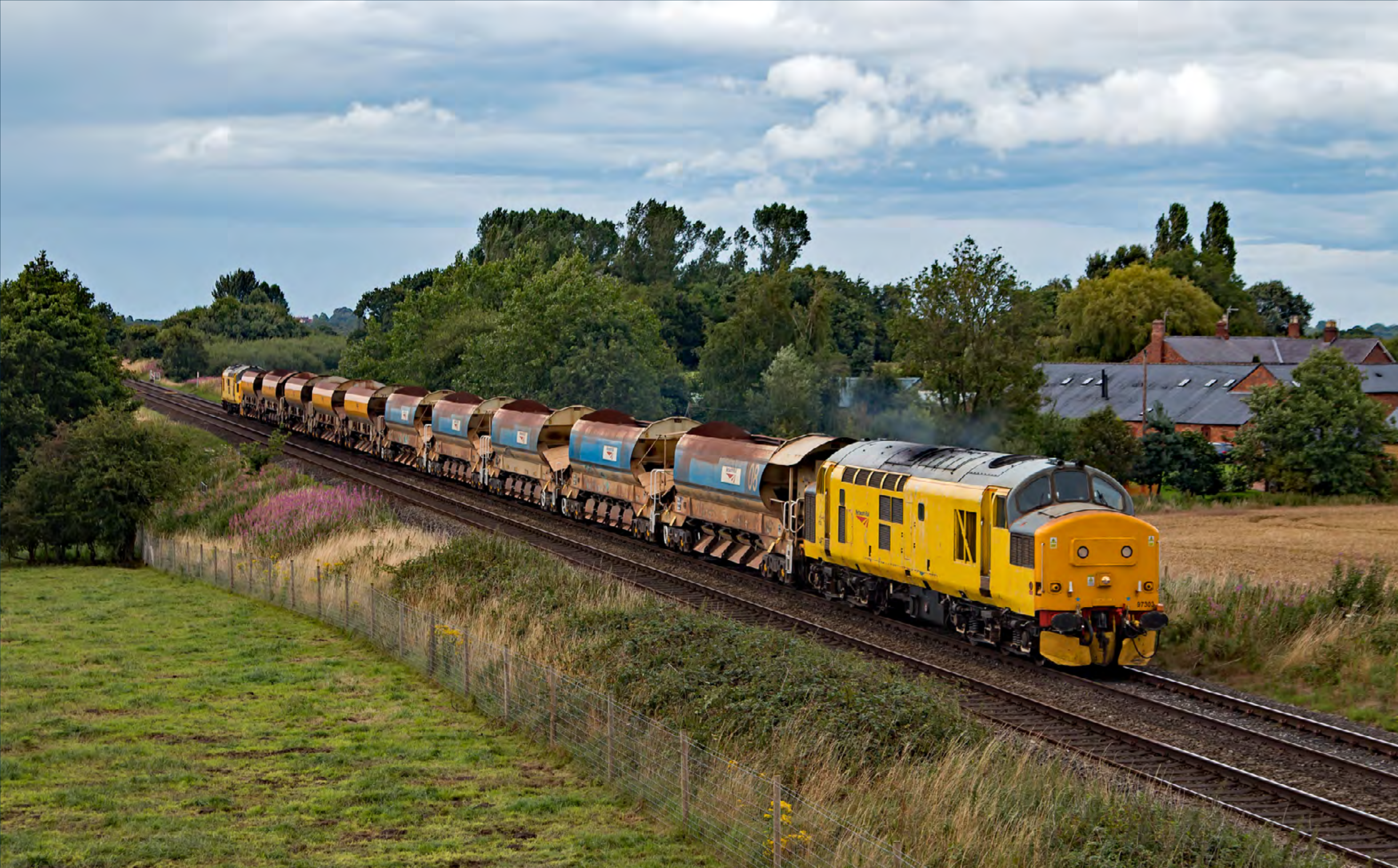
▶ Class 97 303 (with 97 302 on the rear) heads through Steel Heath on July 30th working the 6C70 Crewe - Barmouth. Carl Grocott