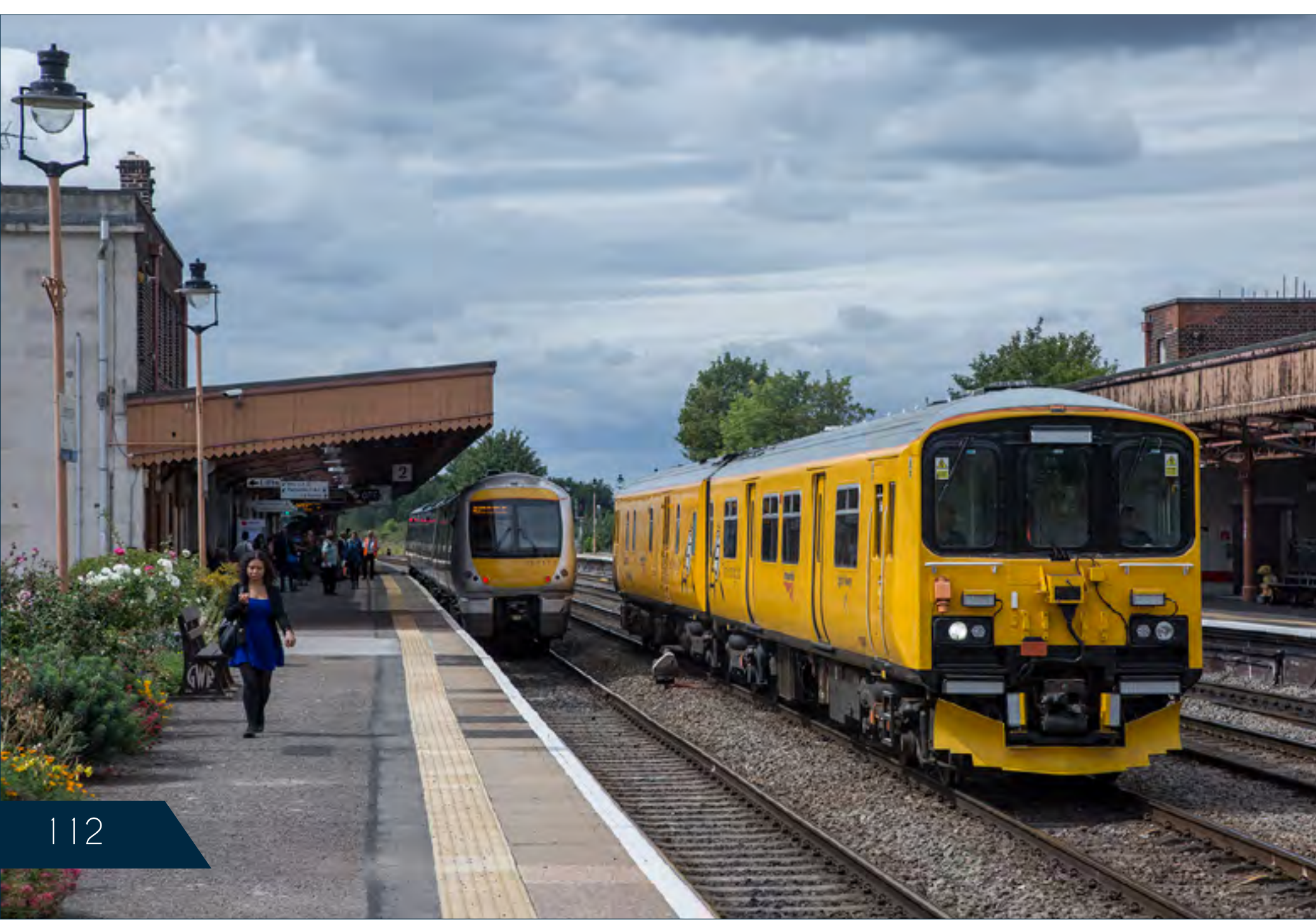
▶ Class 950 001 passes through Leamington Spa on August 7th, heading south.