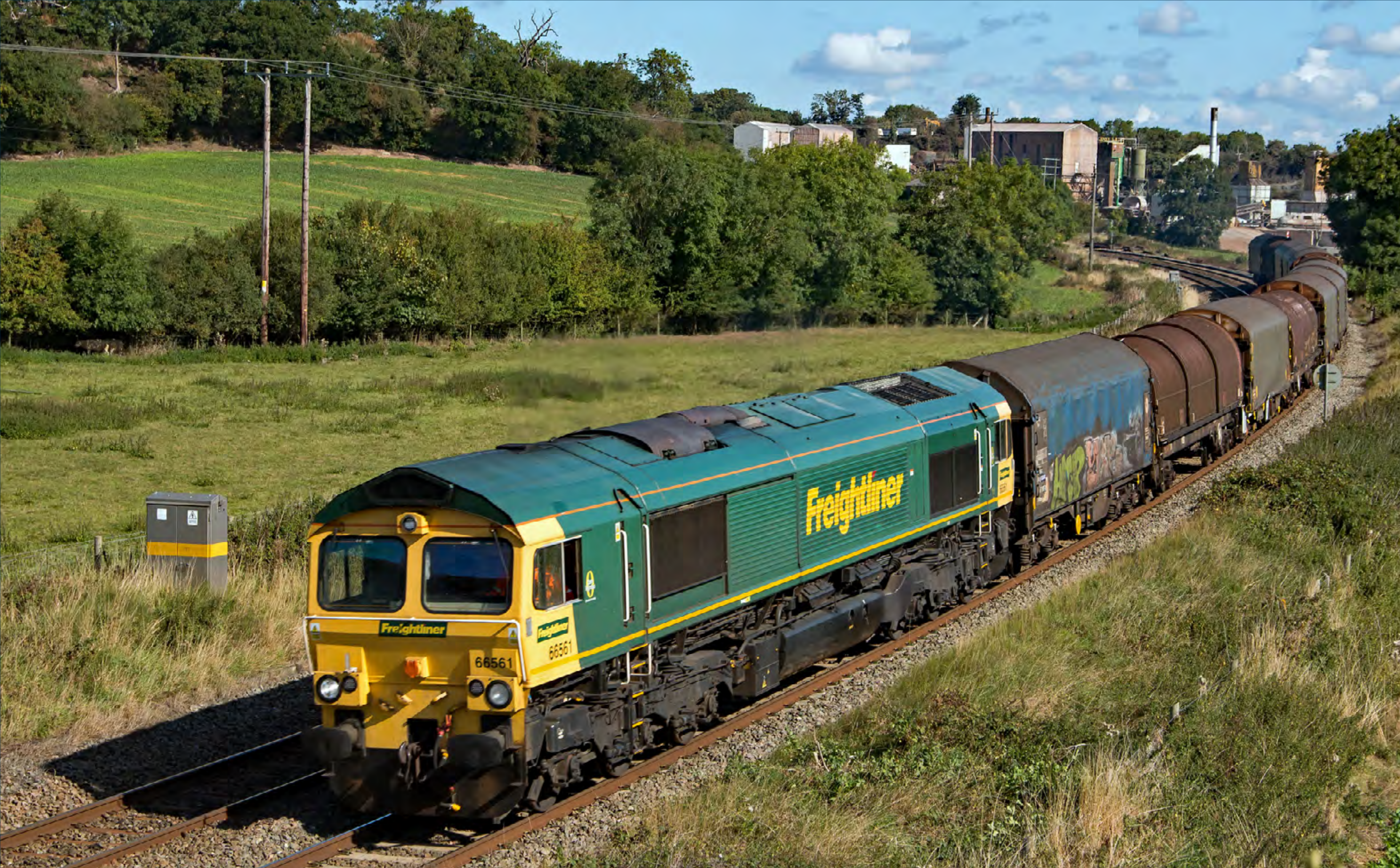
▶ Class 66 561 working the 6V75 Dee Marsh - Margam, passes Burgs Lane on September 2nd. Carl Grocott