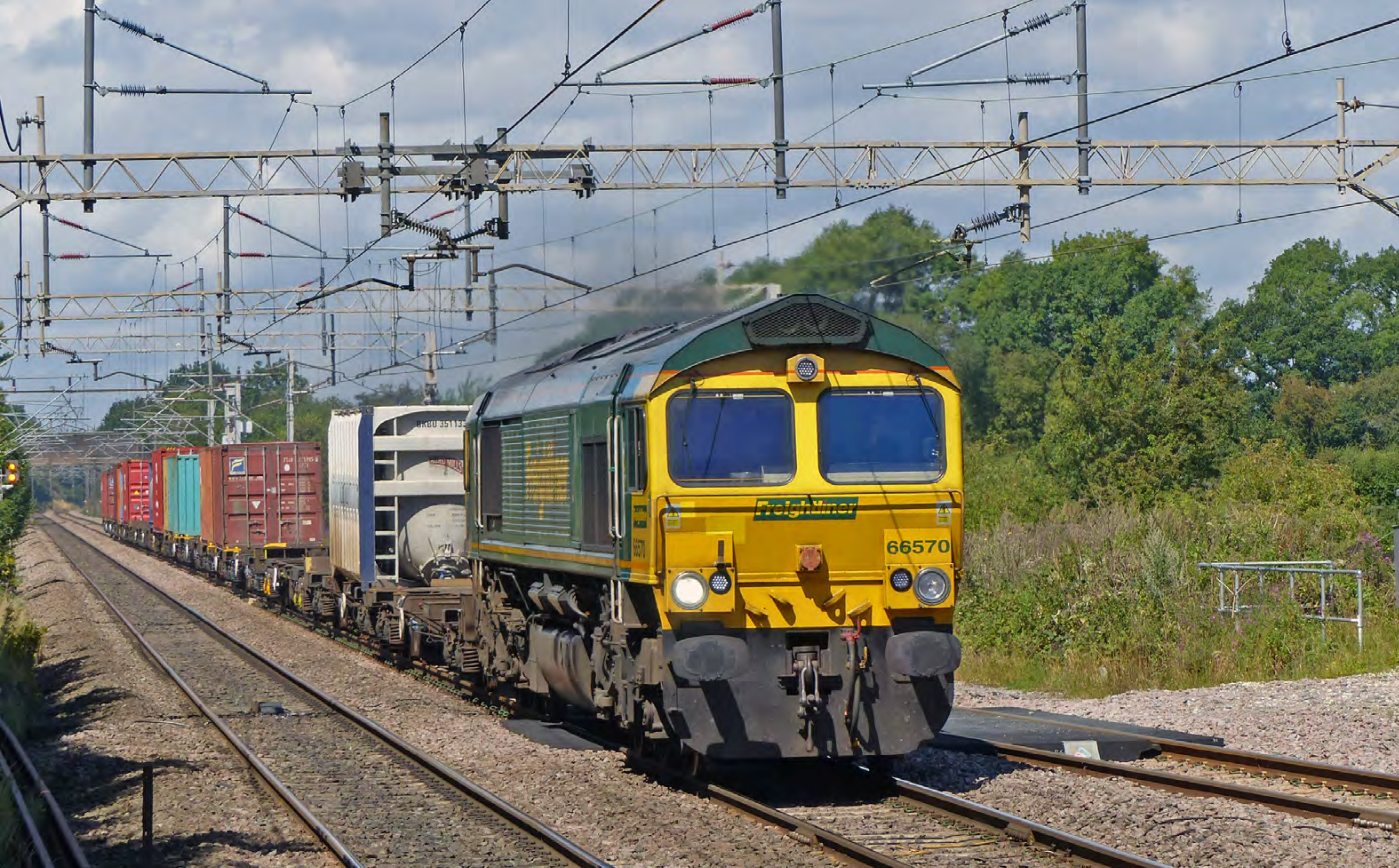
▶ Class 66 570 passes through Acton Bridge on August 4th with a Garston FLT - Crewe Basford Hall liner.