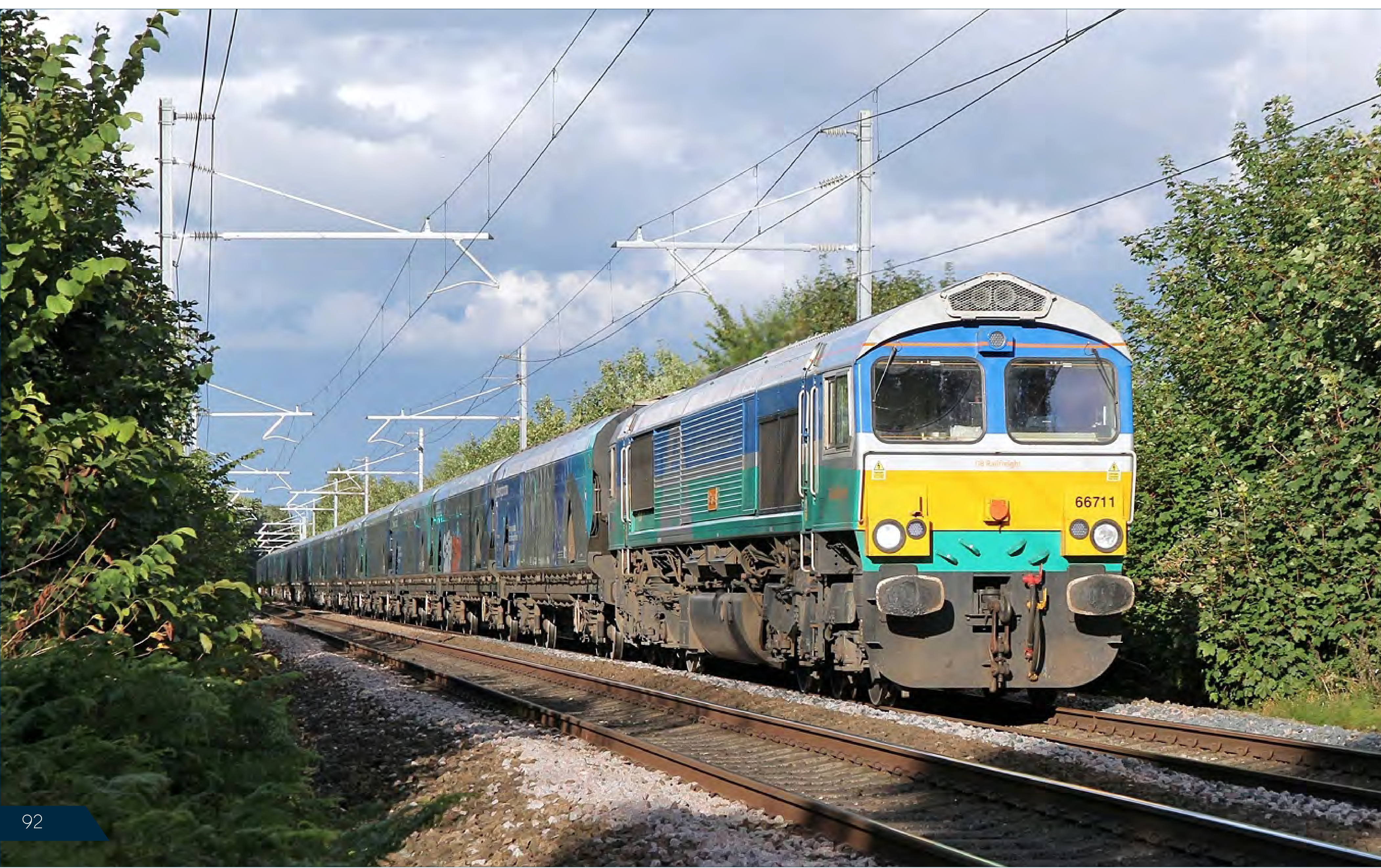
▶ On August 17th, Class 66 776 heads through Burton with a second working of 6G16 Stud Farm - Bescot loaded self discharge stone train. Stuart Hillis