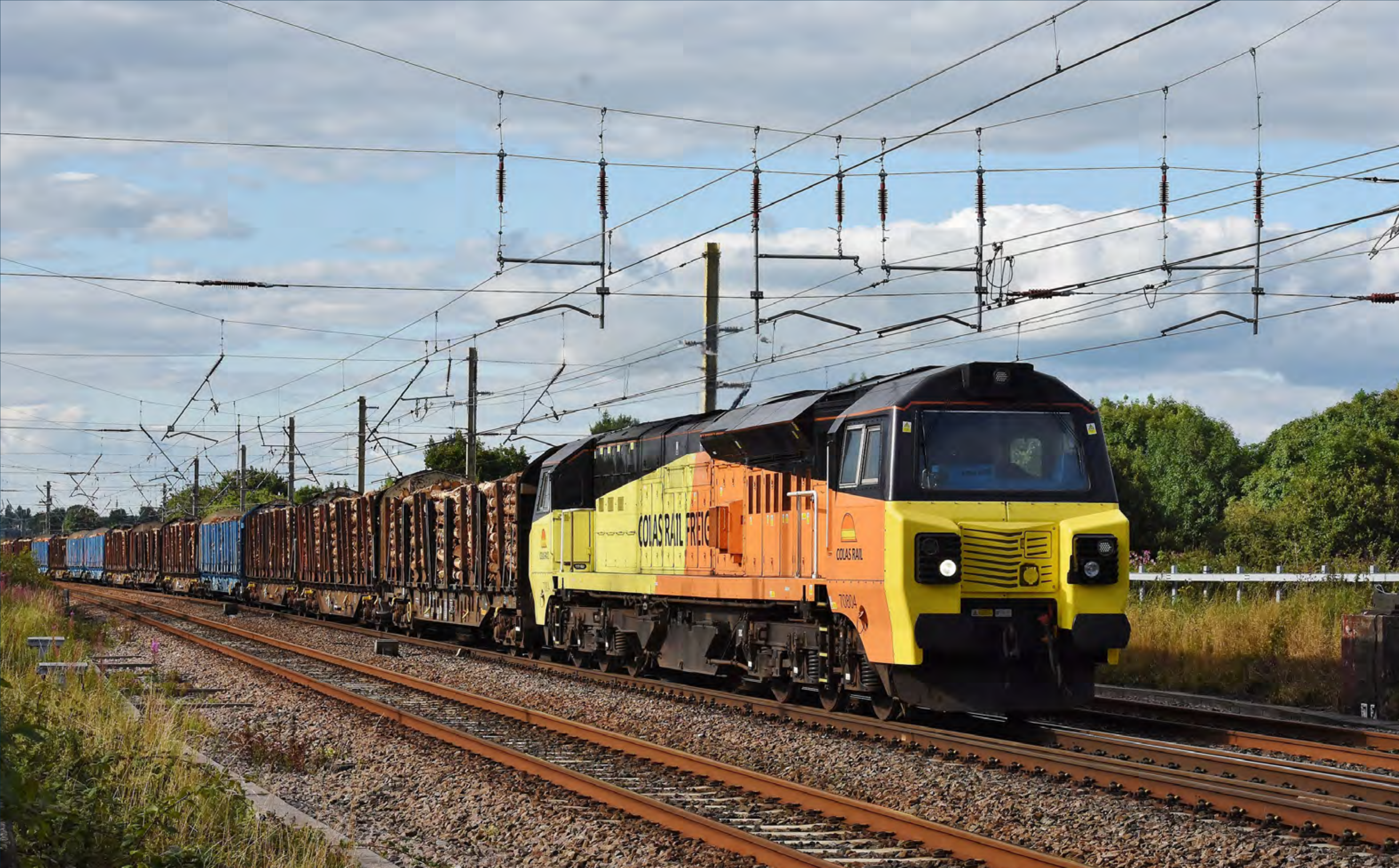
Class 70 804 powers off the slow line at Balshaw Lane Junction with the Carlisle - Chirk log train on August 9th.