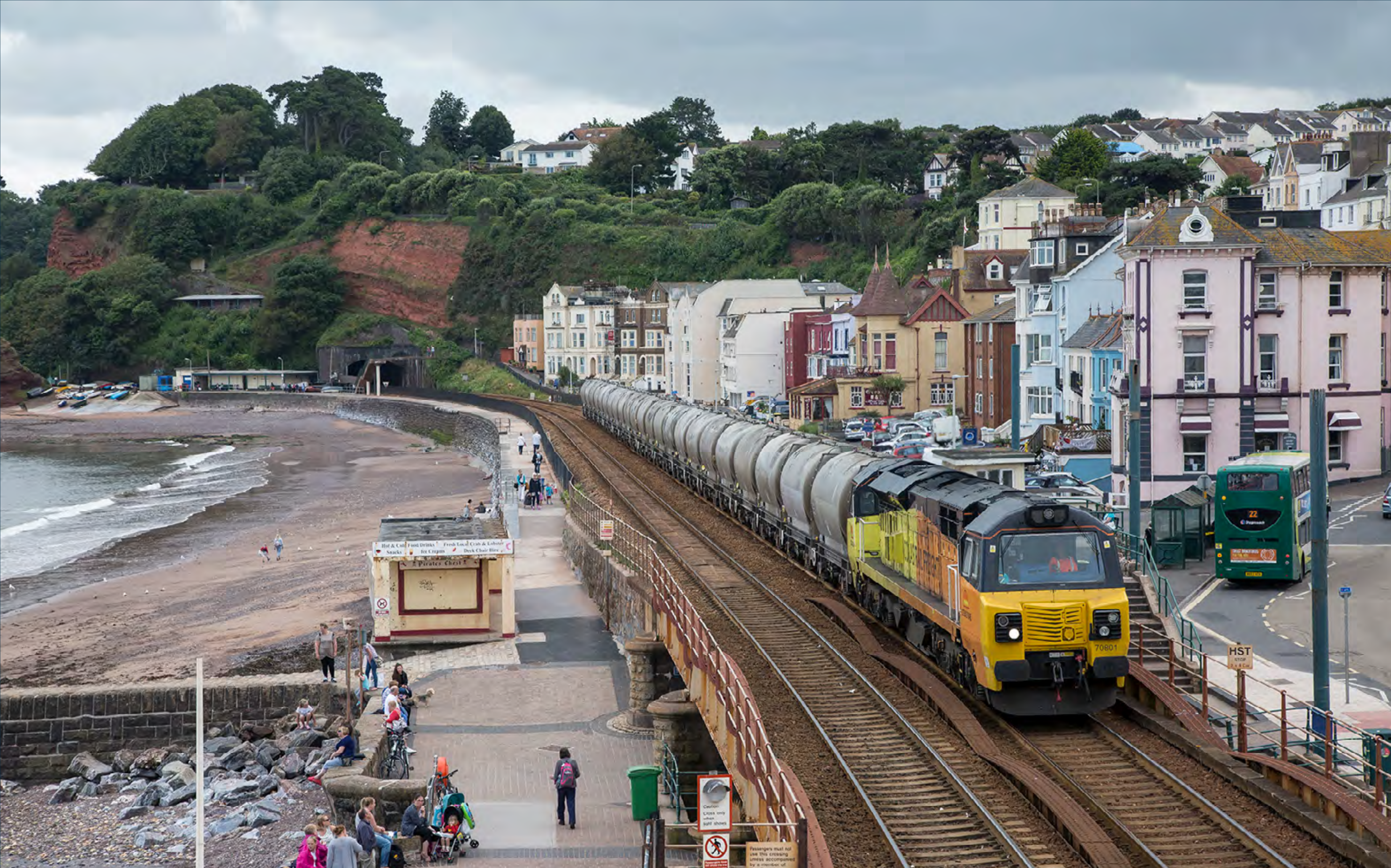
On July 27th, Class 70 801 approaches Dawlish working the Moorswater to Aberthaw tanks.