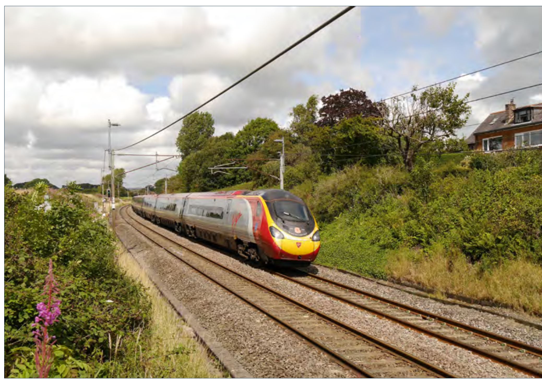
Virgin Trains’ Class 390 103 nears Brock with the 1M12 11:40 Glasgow Central - London Euston service on August 7th.