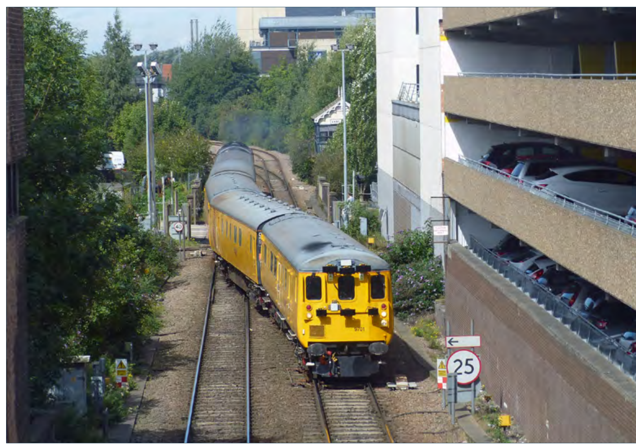
▶ BR blue large logo Highland liveried Class 37 025 'Inverness TMD' and DBSO No. 9701 works Derby RTC - Exeter Riverside test train, through Burton on August 7th.