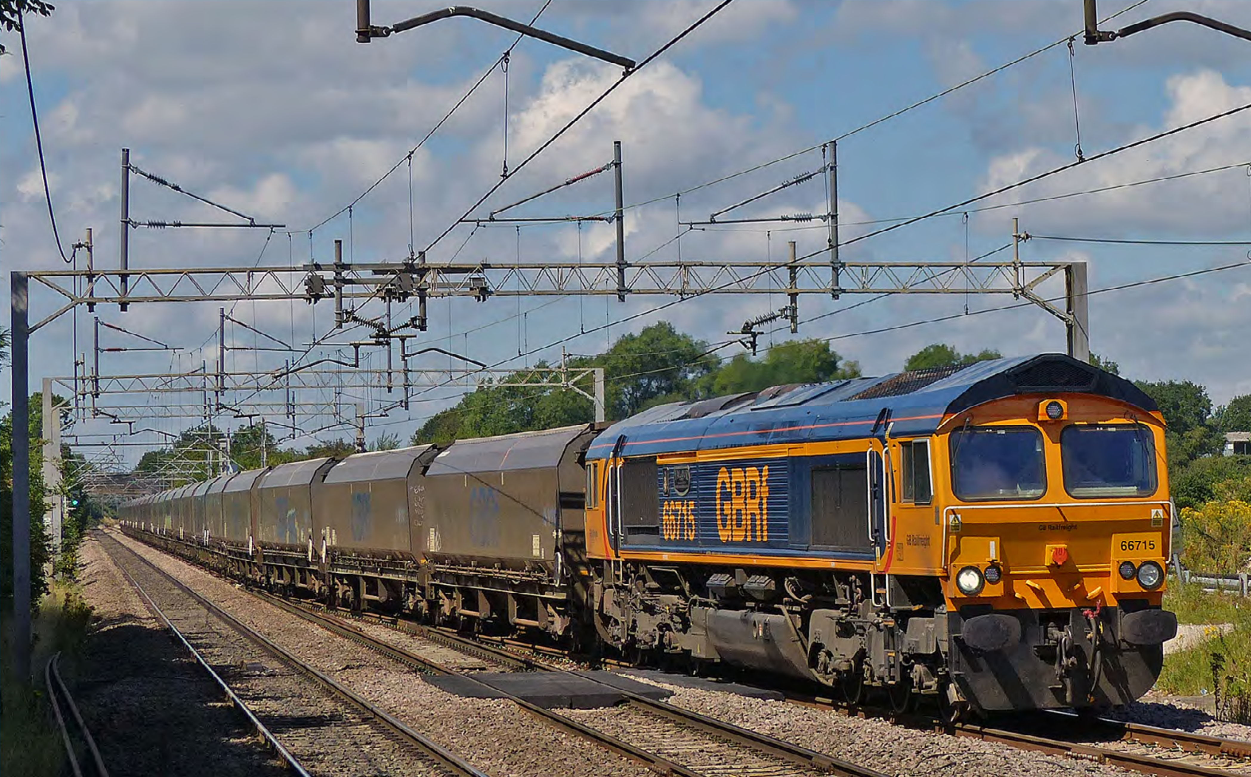
▶ On August 4th, Class 66 715 passes through a sunny Acton Bridge working a Liverpool Biomass Terminal - Drax AES Biomass train.