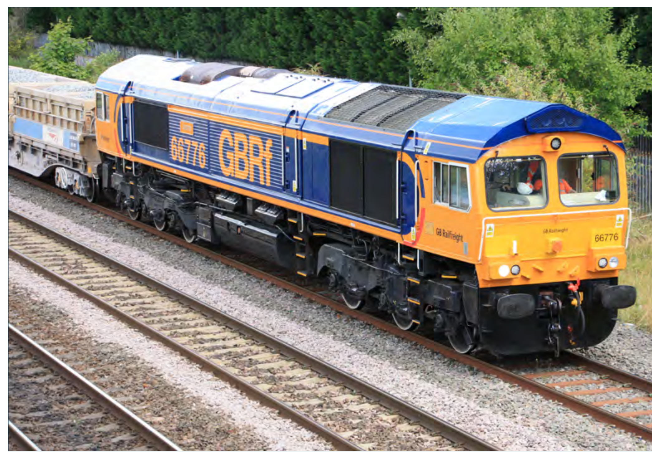
▶ On August 15th, Class 66 776, newly named 'Joanne' working 6G16 Cliffe Hill Stud Farm - Bescot loaded NR discharge wagons, passes Burton on a strange route, via Leicester - Loughborough - Stenson - Burton, then Lichfield to Crewe, reverse back to Stafford and Bescot.