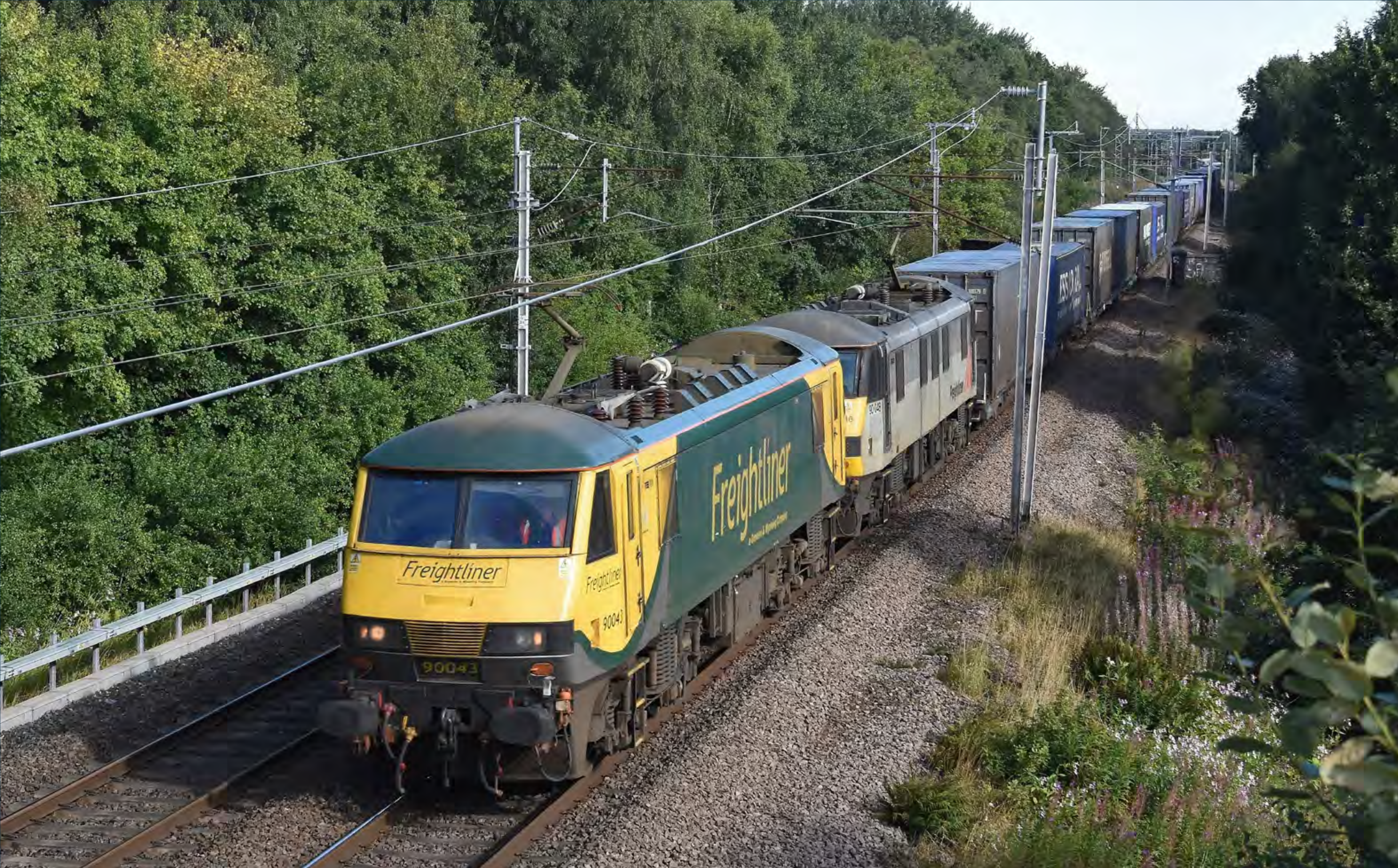
▶ Class 90 043 and 90 048 are seen speeding down from the former Standish Junction with the 4M27 Coatbridge - Daventry on August 16th. John Sloane