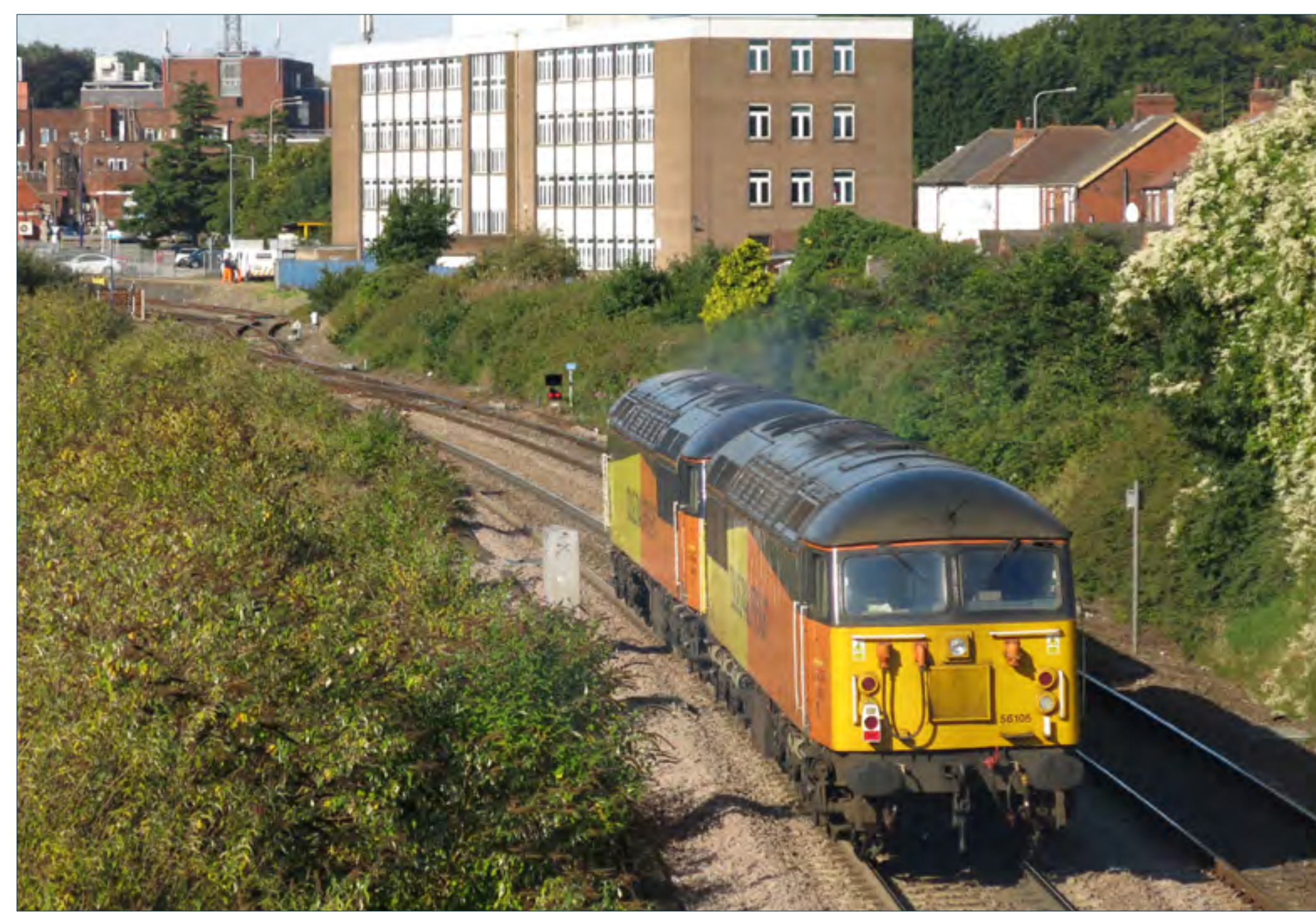
On September 1st, Class 56 096 and 56 105 head through Scunthorpe working the 0Z56 Barnetby Down Sidings - Doncaster CHS.