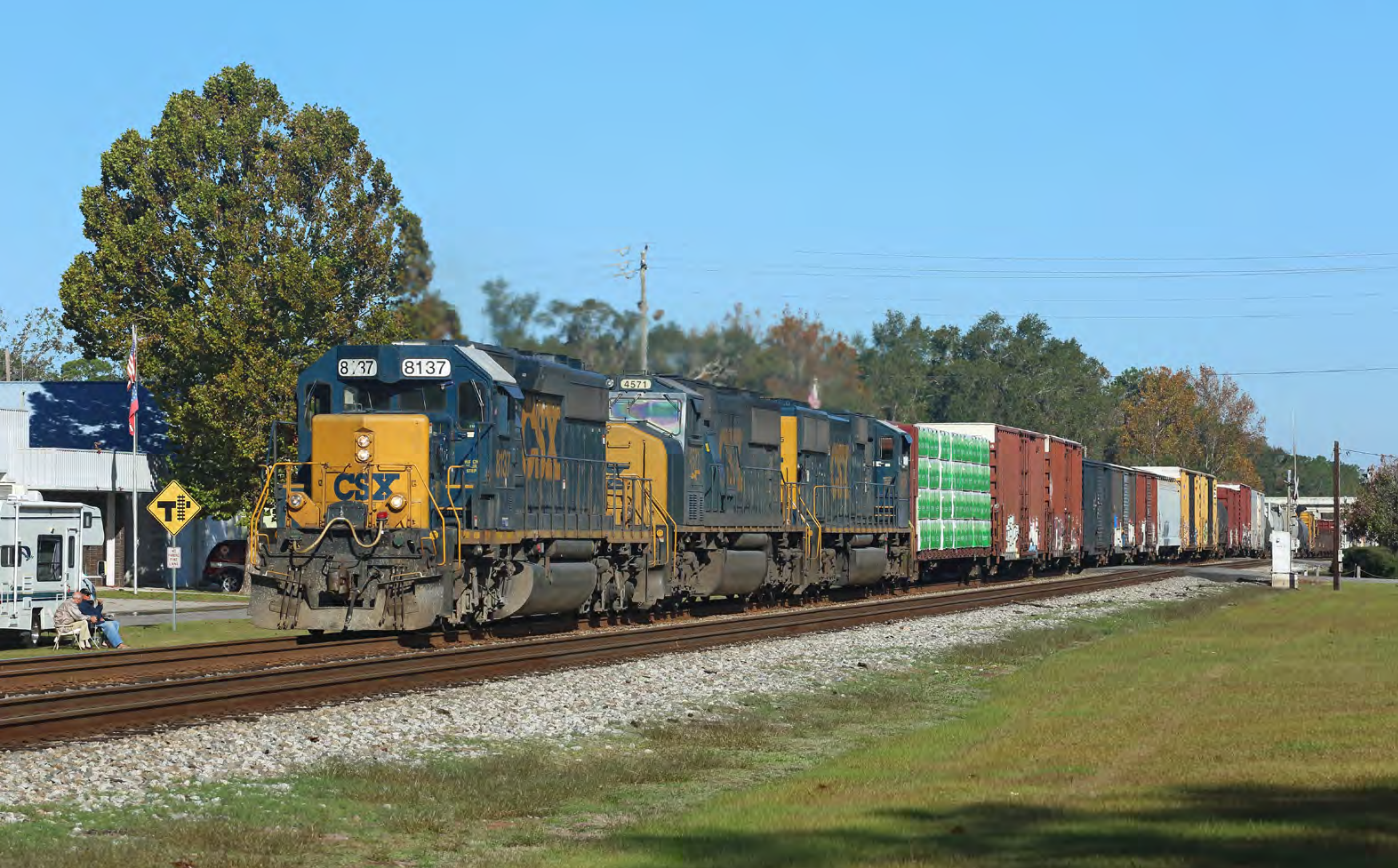
CSX SD40-2 No. 8137, SD70MAC Nos. 4571 and 4585 pass Folkston with a southbound manifest train. Laurence Sly