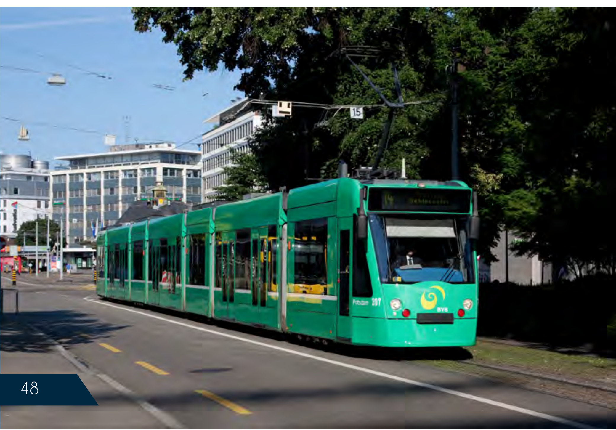
▶ Basel tram No. 307 heads along Aeschenplatz with a line No. 14 service. Paul Godding