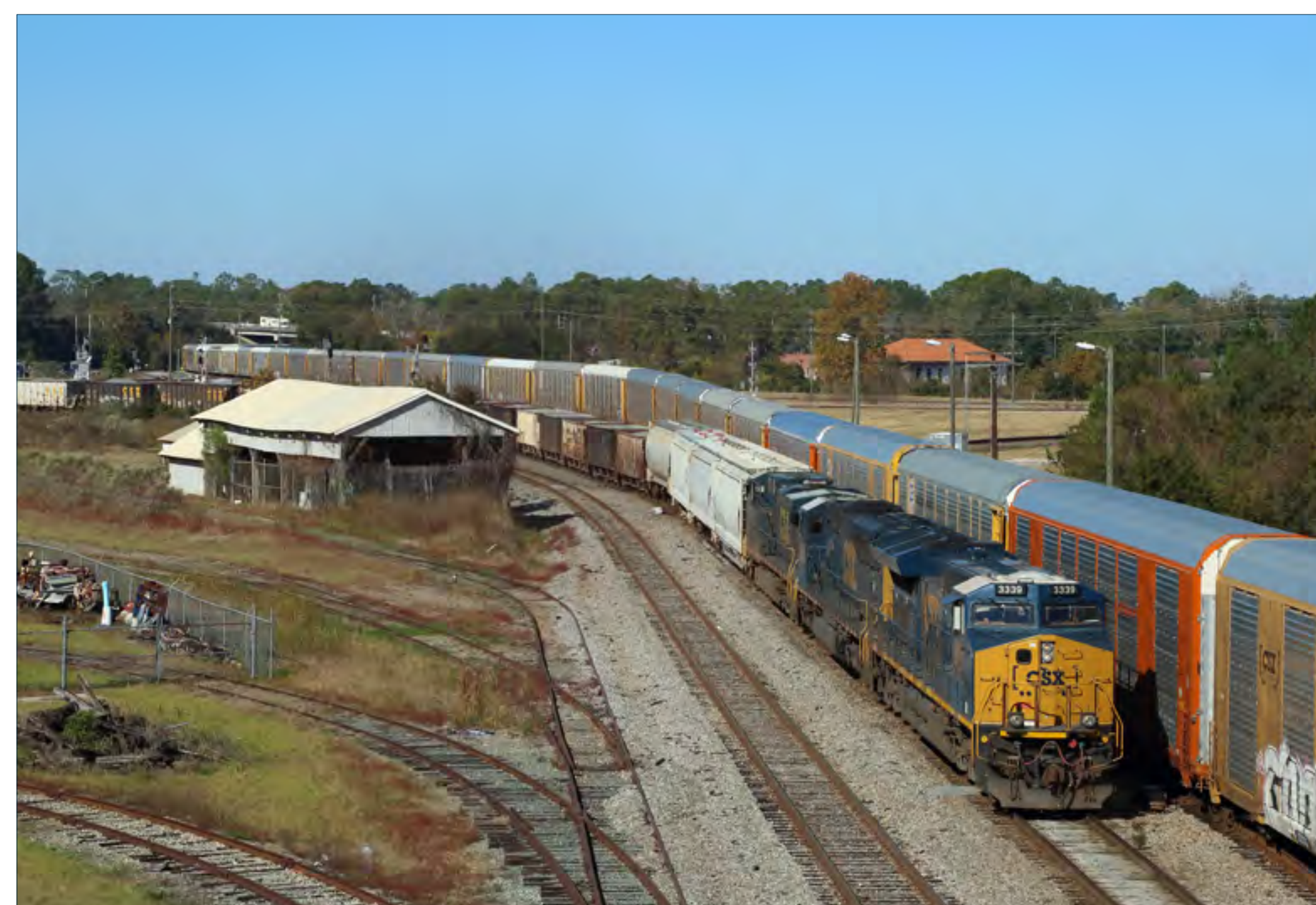
CSX ET44AH No. 3339, SD70MAC No. 4704 and ES40DC No. 5305 depart Waycross with a southbound manifest train. Laurence Sly