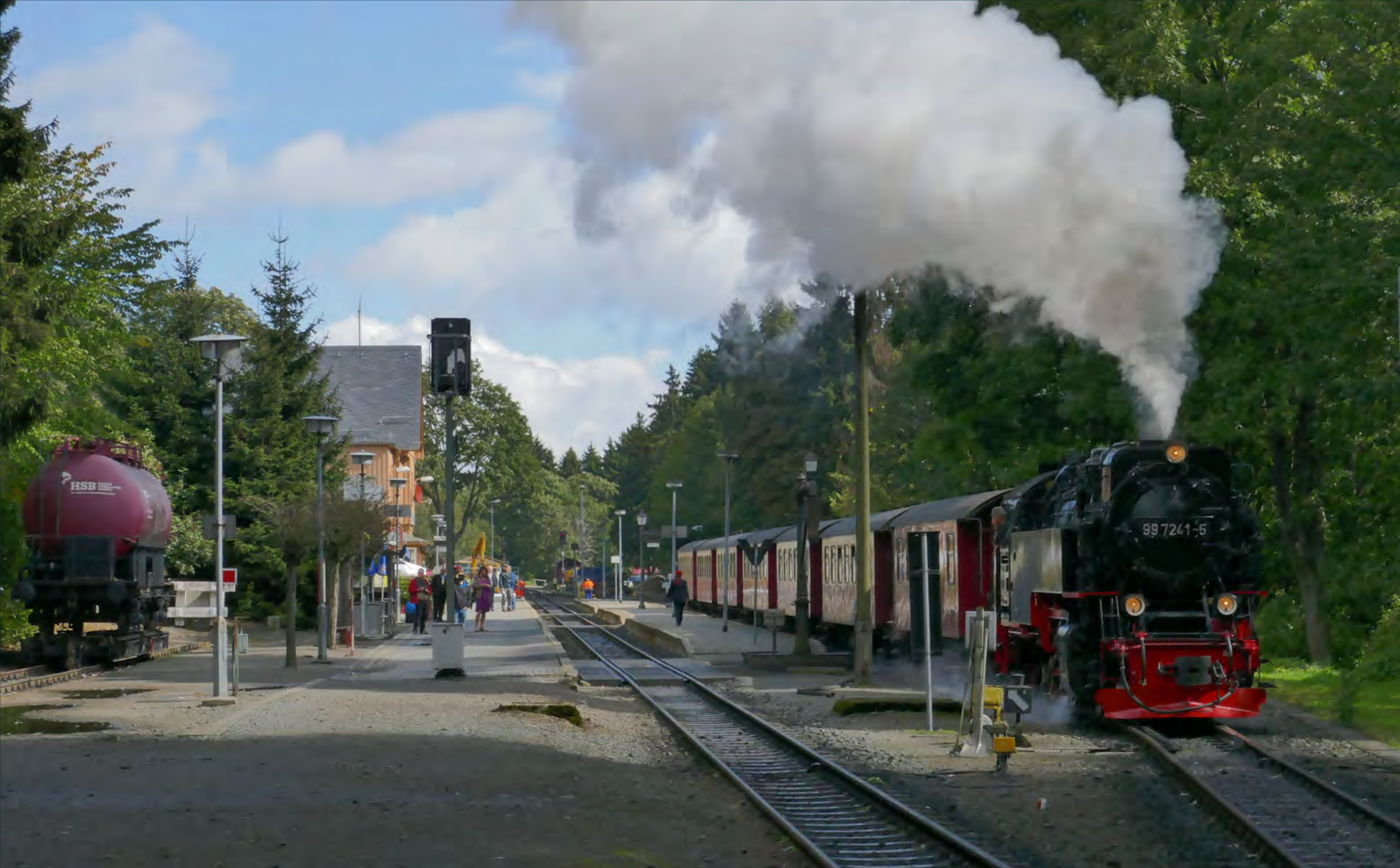
▶ HSB No. 99.7241 departs Drei Annen Hohne. Stearnsounds