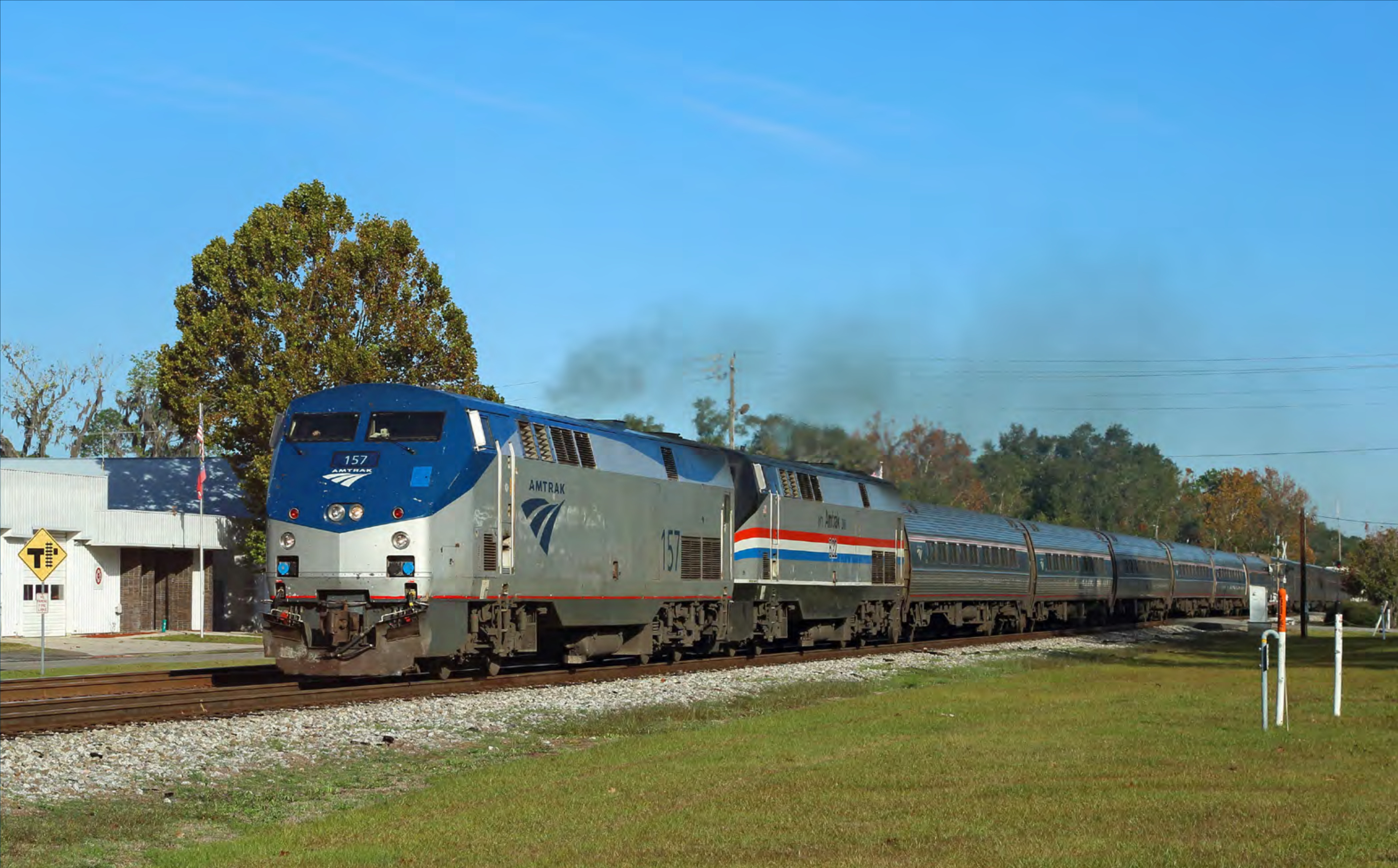
Amtrak's P40 No. 157 and P42 No. 822 storm through Folkston whilst working Amtrak train No. 97 'The Silver Meteor' from New York to Miami. Laurence Sly