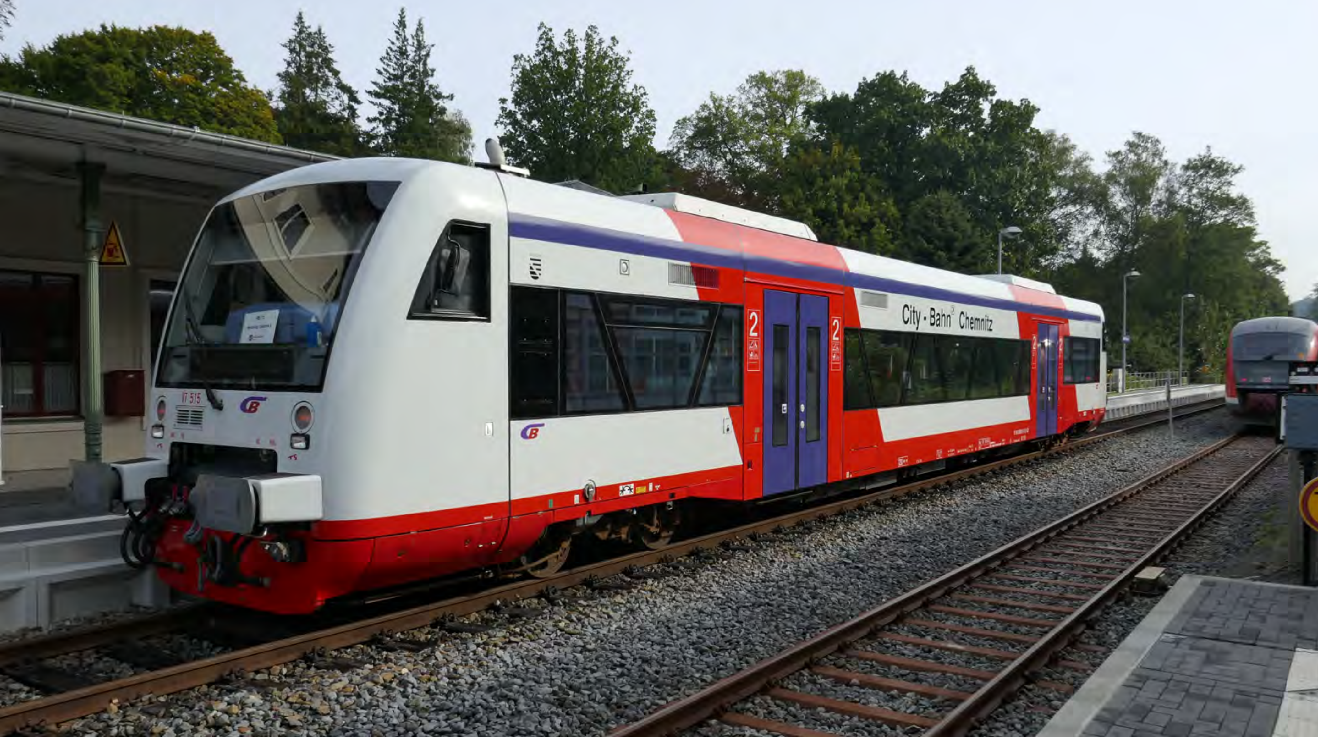
▶ A City-Bahn Chemnitz branded railcar well away from home at Sebnitz is seen working trains between there and Pirna. Stearnsounds