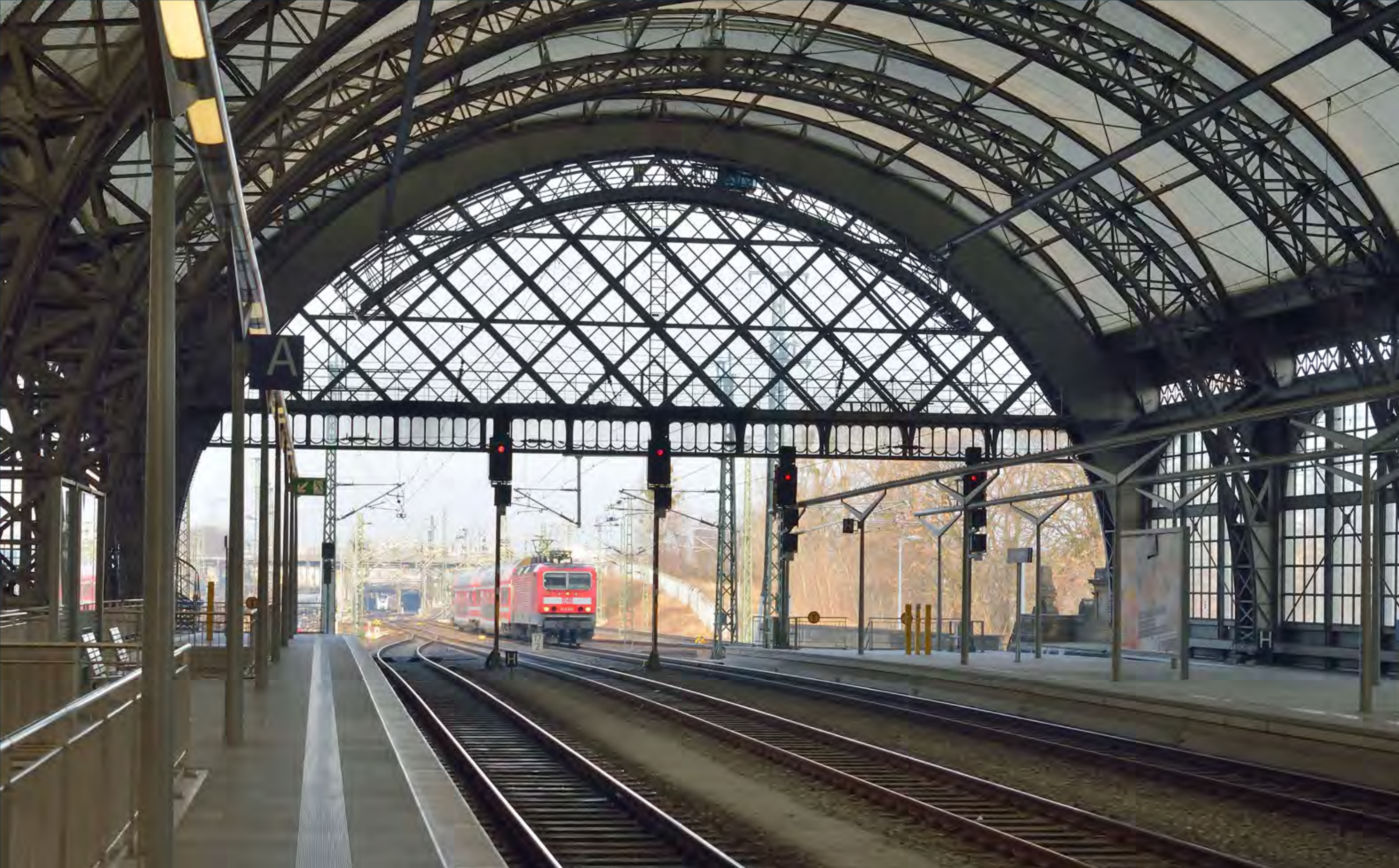
DB Regio Class 143.967 arrives at Dresden Hbf on February 20th, working an S2 service to Pirna. Class47