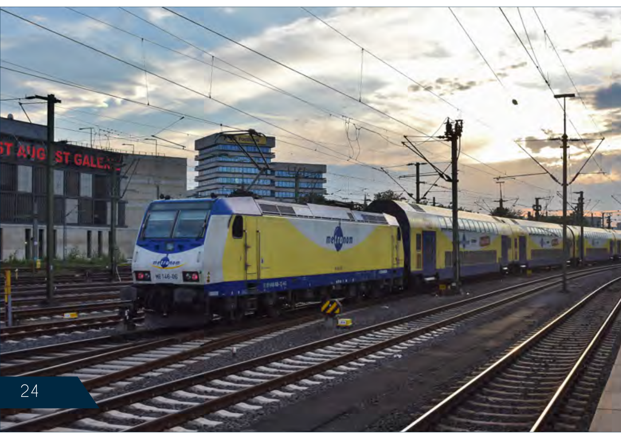
▶ Metronom No. ME146-06 (Class 146.506) approaches Hannover with a service to Uelzen.