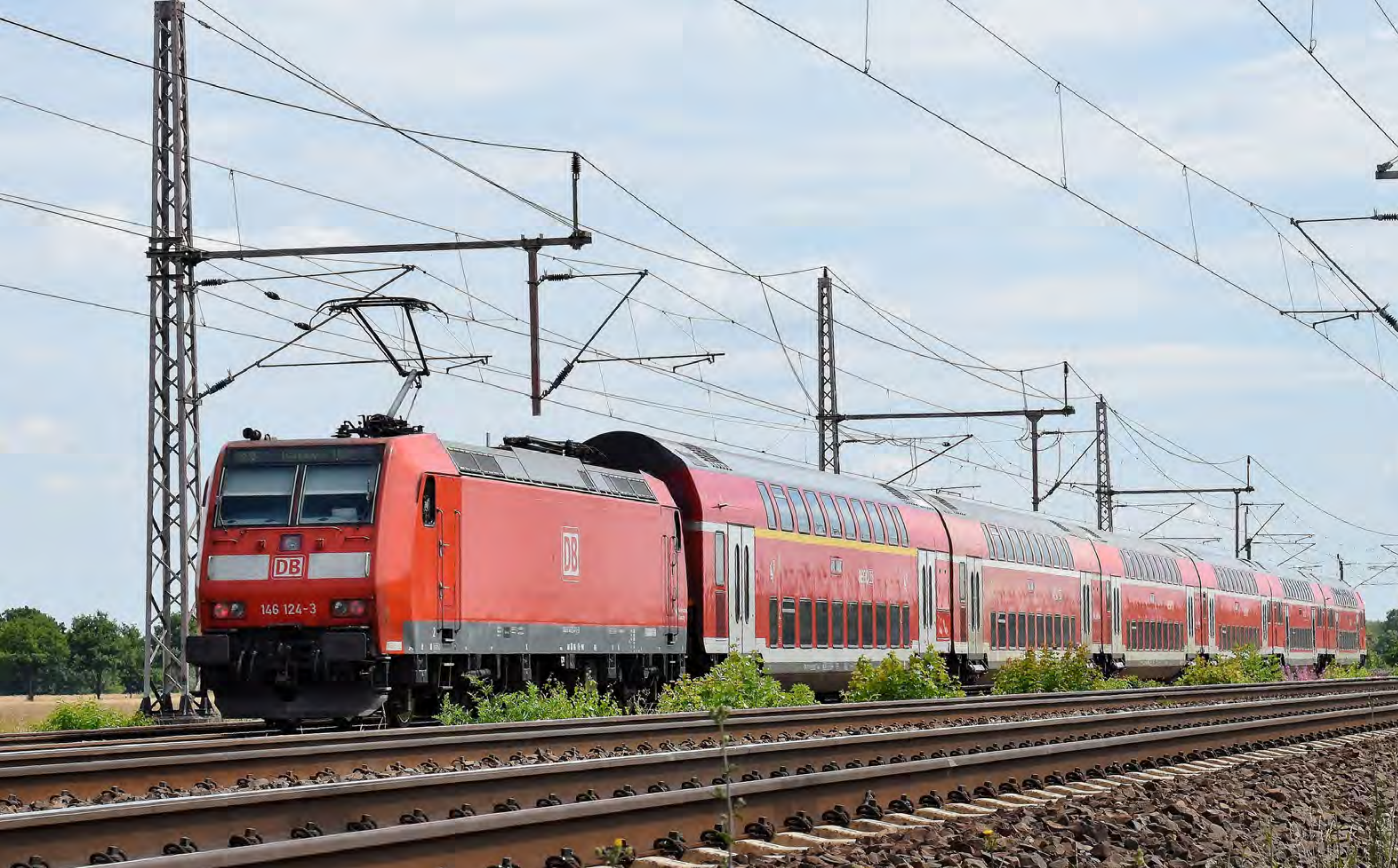
DB Regio Class 146.124 is seen near Dedensen-Gümmer with a RE8 service to Hannover Hbf.