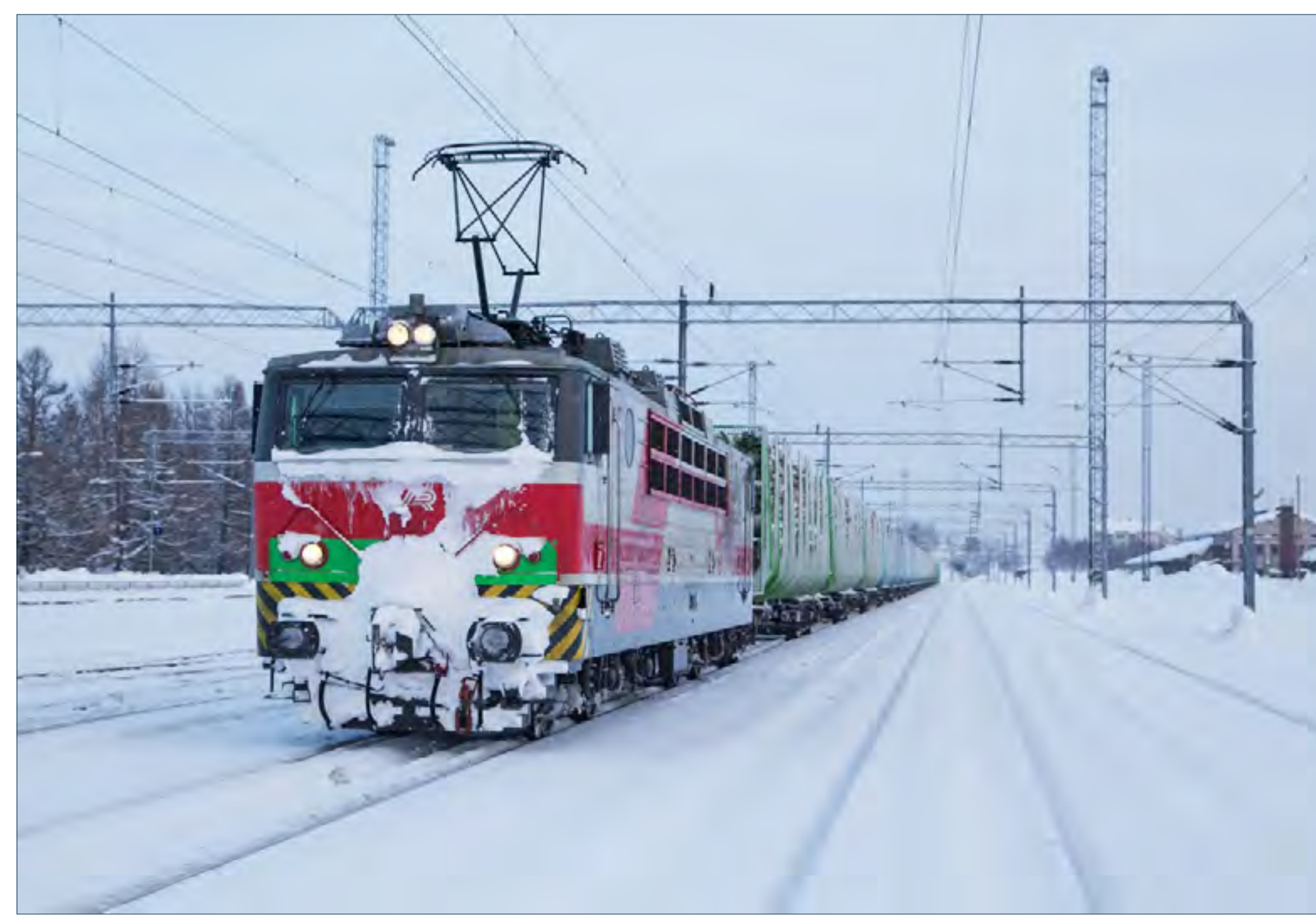
▶ Finnish Railways Sr1 VR No. 3077 arrives at a rather cold (-12!) Kemi with an IC train to Oulu on February 9th.