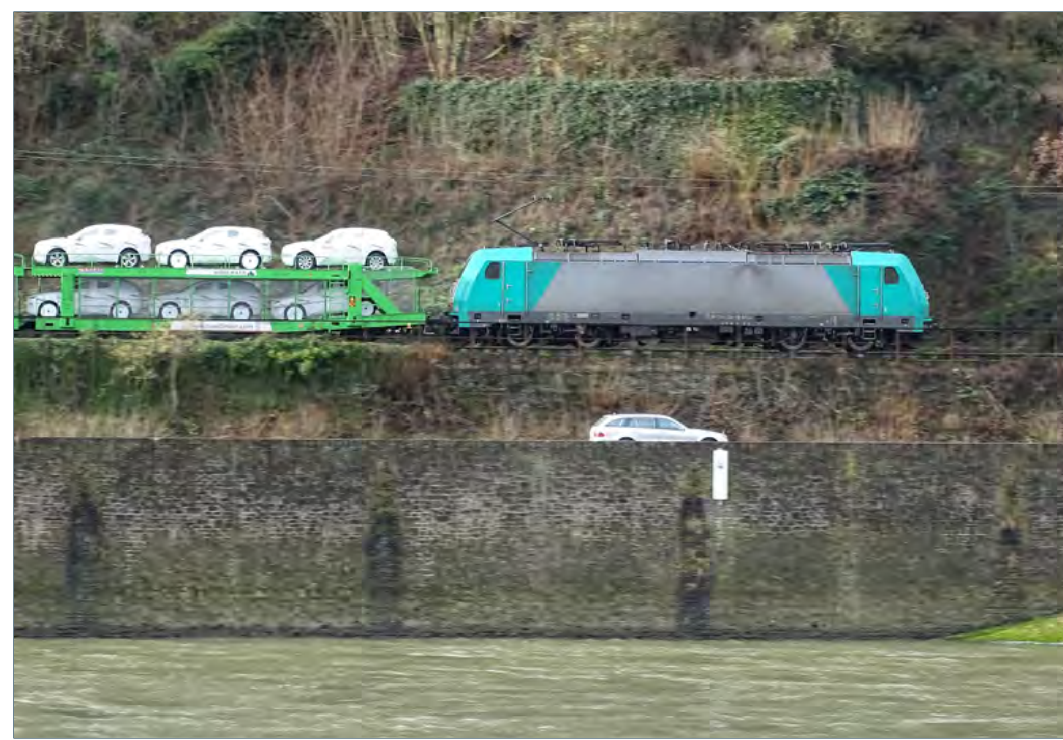
▶ On January 17th, Railpool loco Class 187.005 heads south on a freight near Boppard.