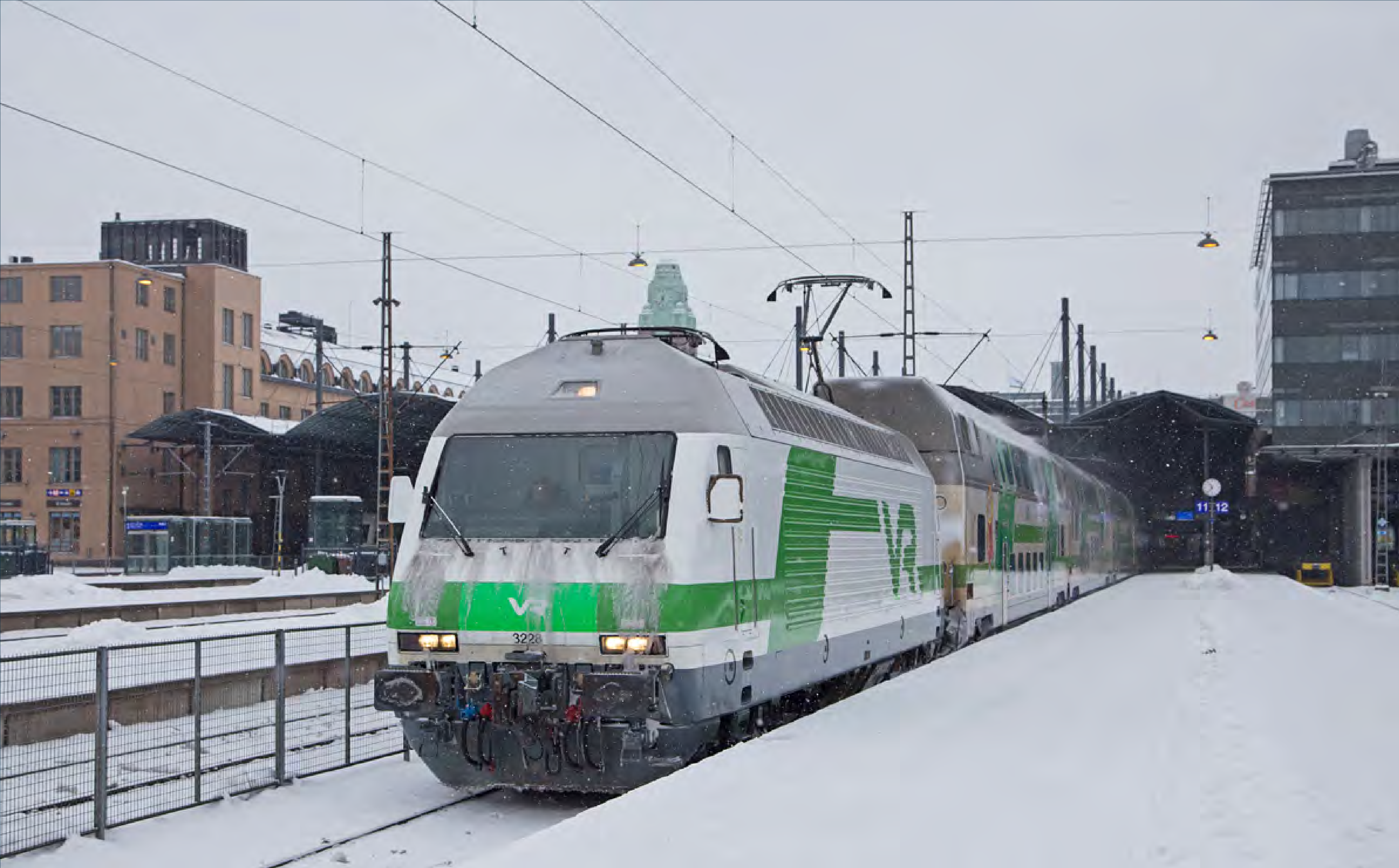
▶ Finnish Railways Sr2 VR No. 3228 departs Helsinki on February 11th.