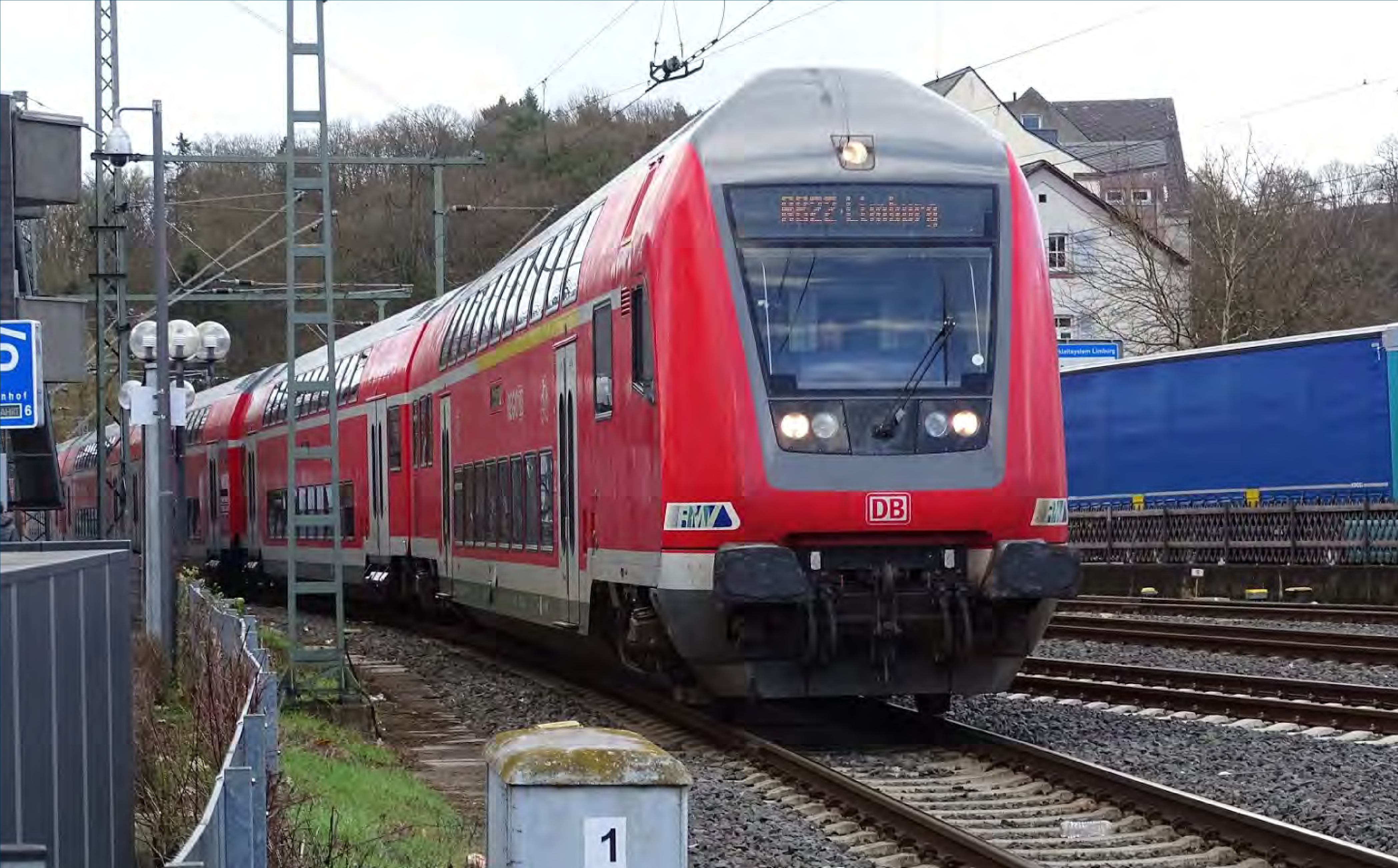
On January 18th, a push-pull service arrives at Limburg with DB Regio Class 143 064 at the rear.