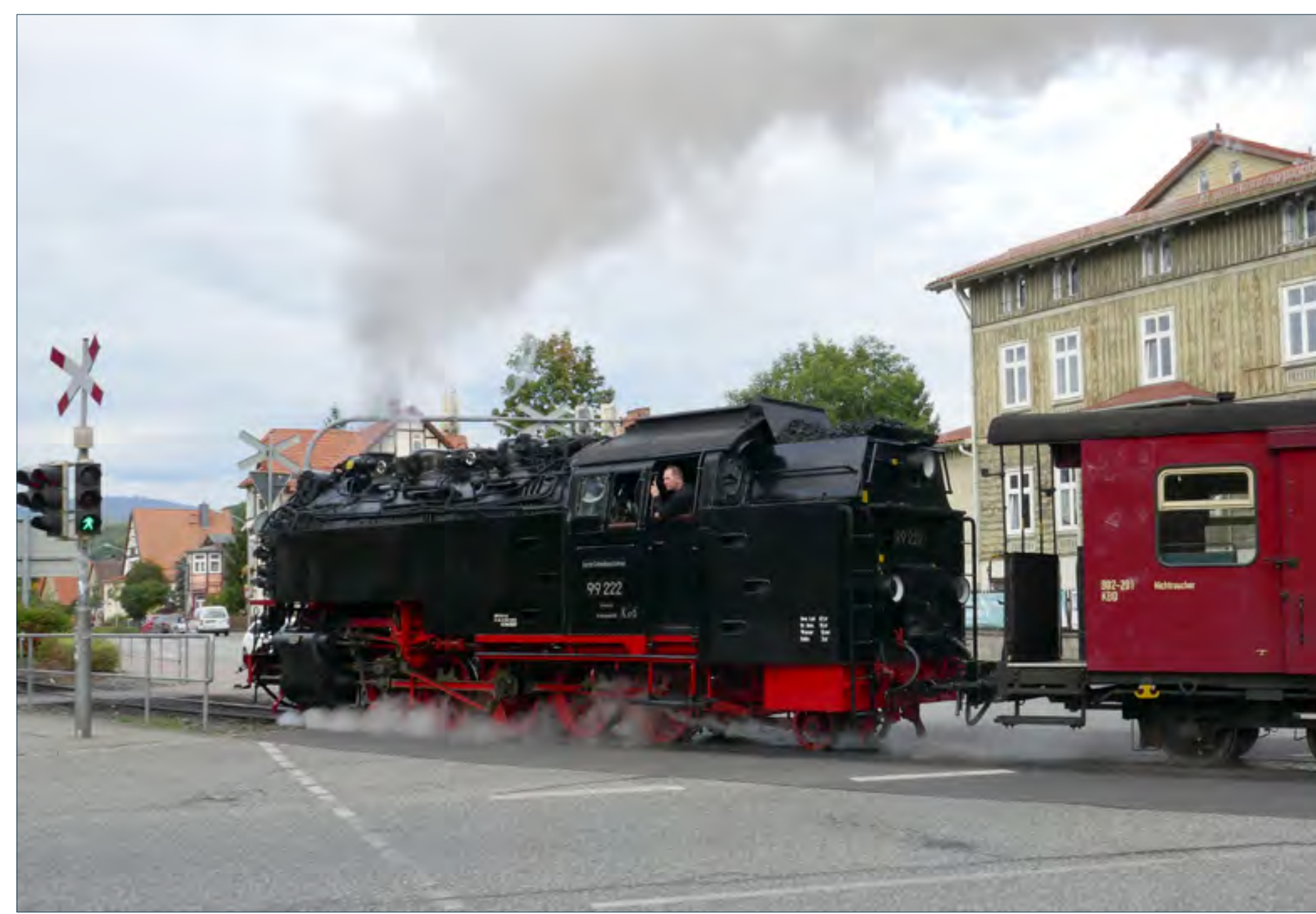
▶ HSB No. 99.222 is seen at the Westerntor road crossing in Wernigerode. Stearnsounds