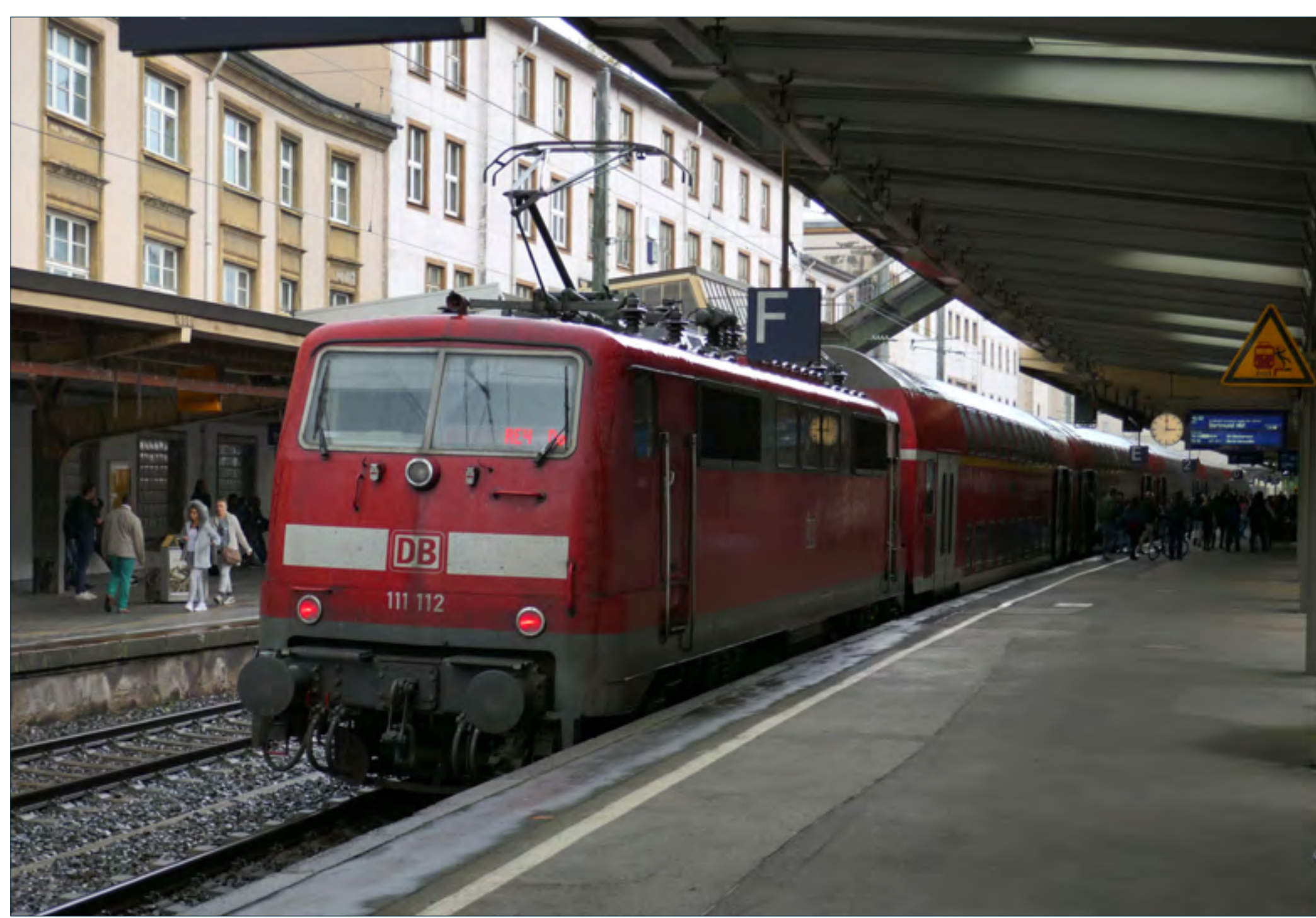
DB Class 111.112 stands at Wuppertal Hbf with an RE4 service to Dortmund Hbf. Stearnsounds