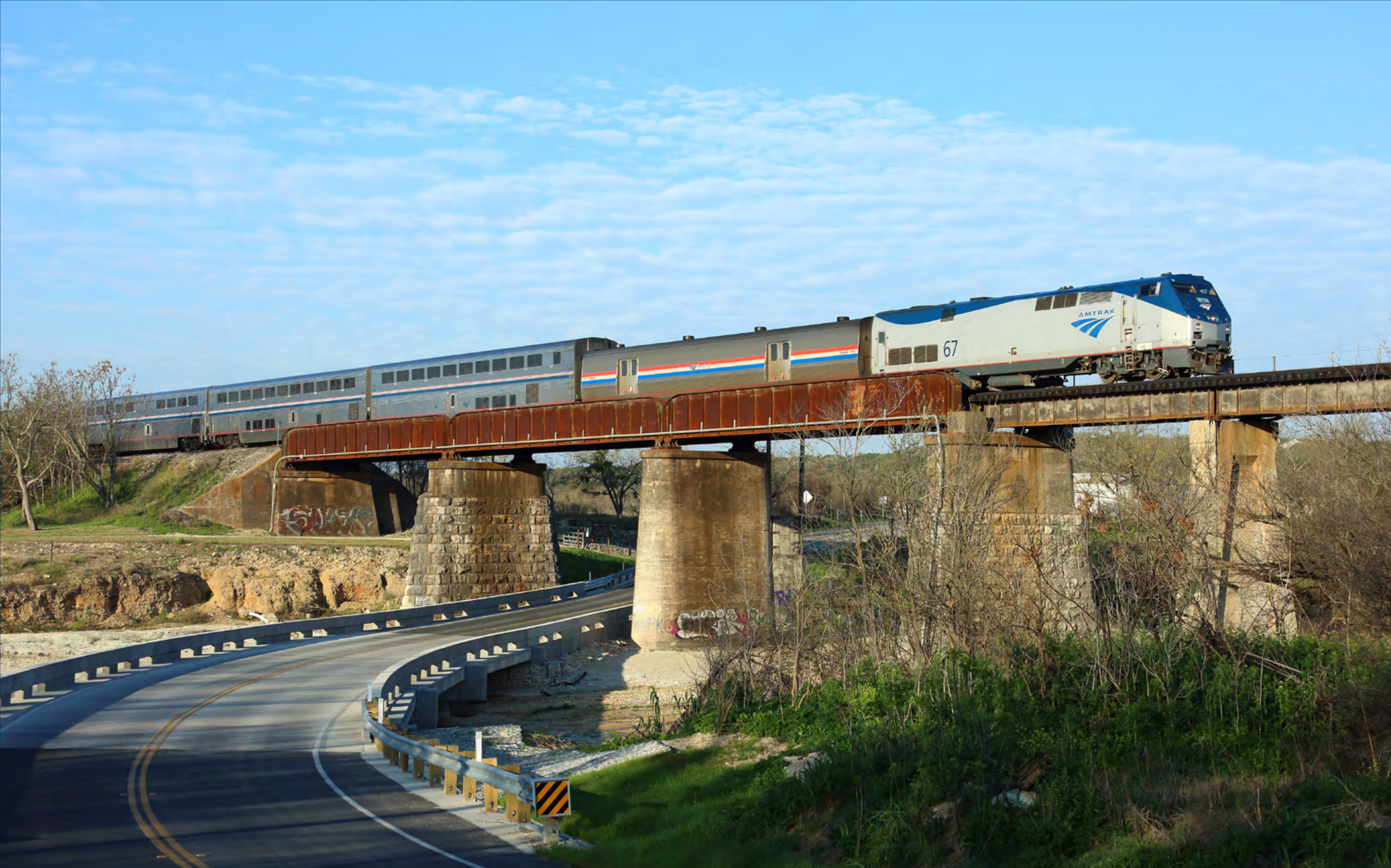
▶ Amtrak No. 67 passes San Marcos whilst hauling train No. 22, 'The Texas Eagle' from San Antonio to Chicago on March 14th. Laurence Sly