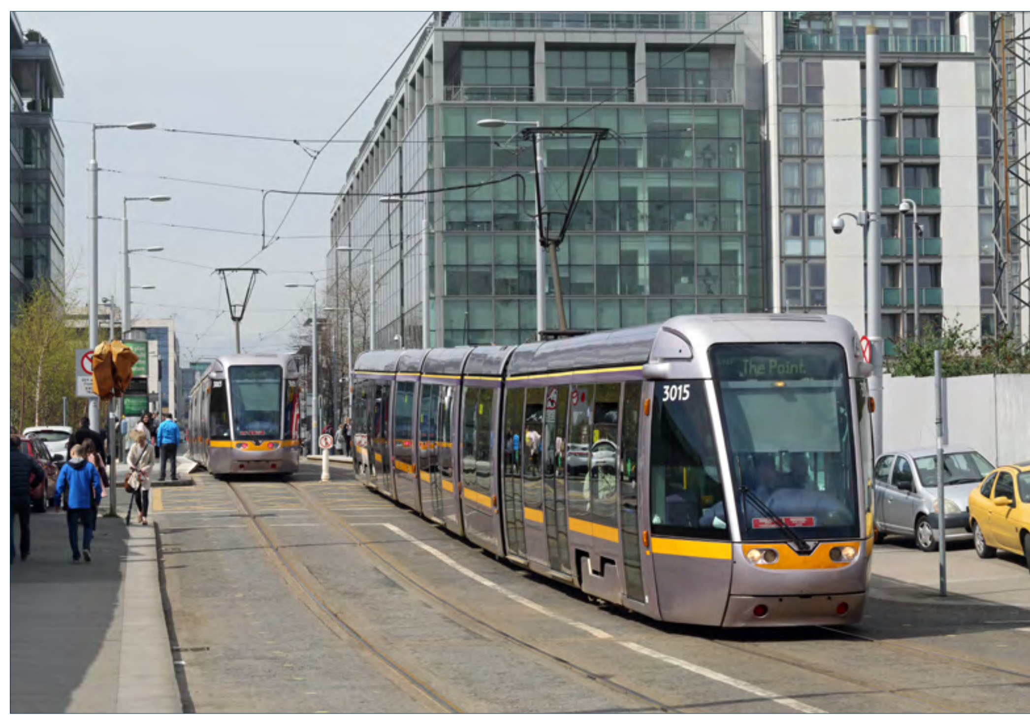
▶ Two Red Line Luas trams pass at Spencer Dock, Dublin.