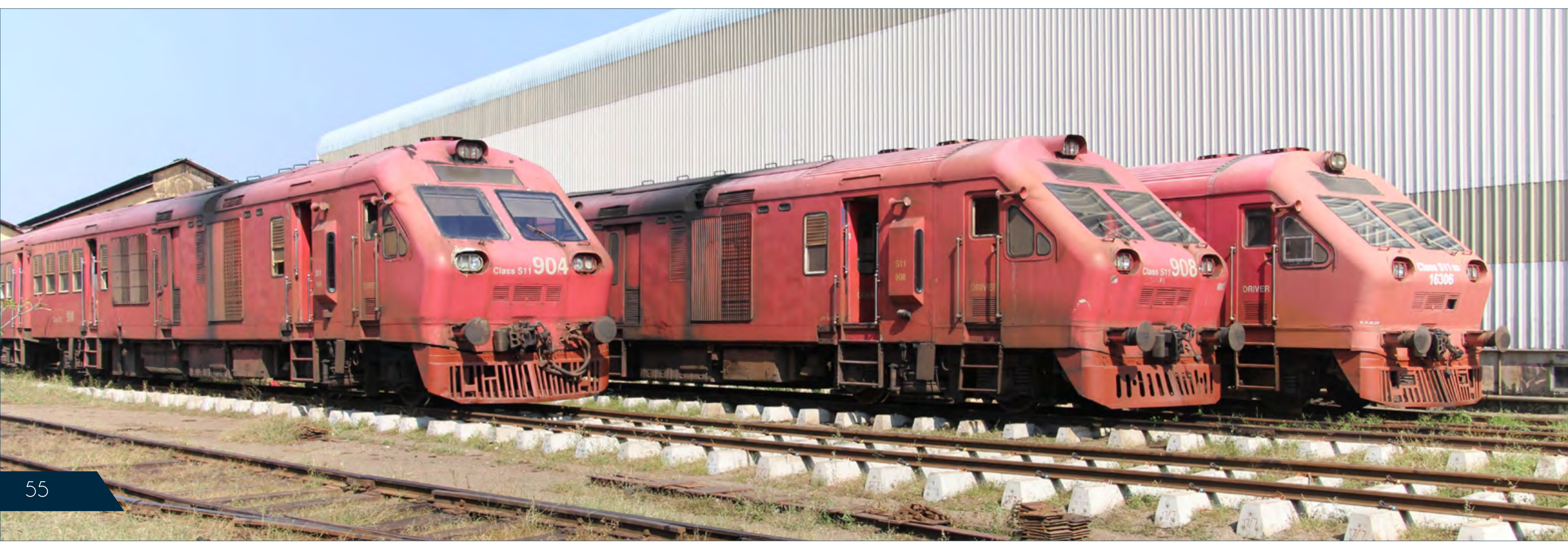
▶ A line-up of Indian-made S11 units at Dematagoda depot on February 18th.