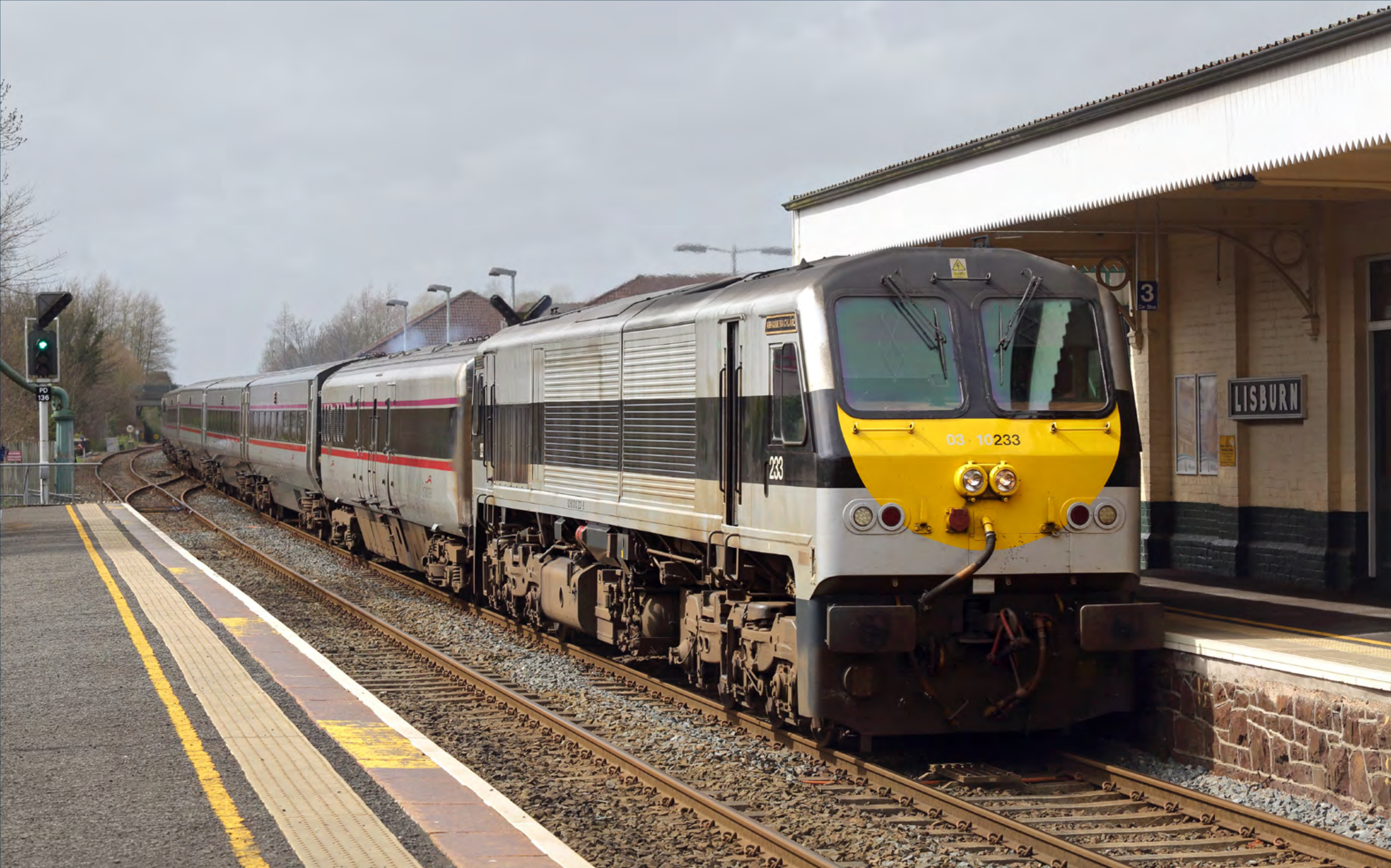
▶ CIE's GM No. 233 heads the 11:20 Dublin Connolly to Belfast Central 'Enterprise' through Lisburn on March 17th.