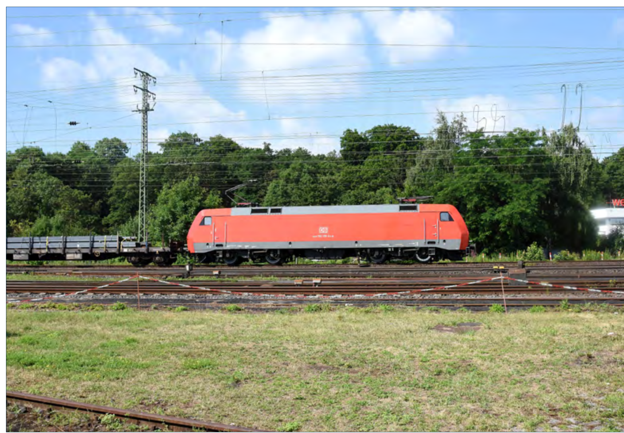
▶ DB Class 152.139 passes Koblenz Lutzel with a loaded steel train. John Sloane