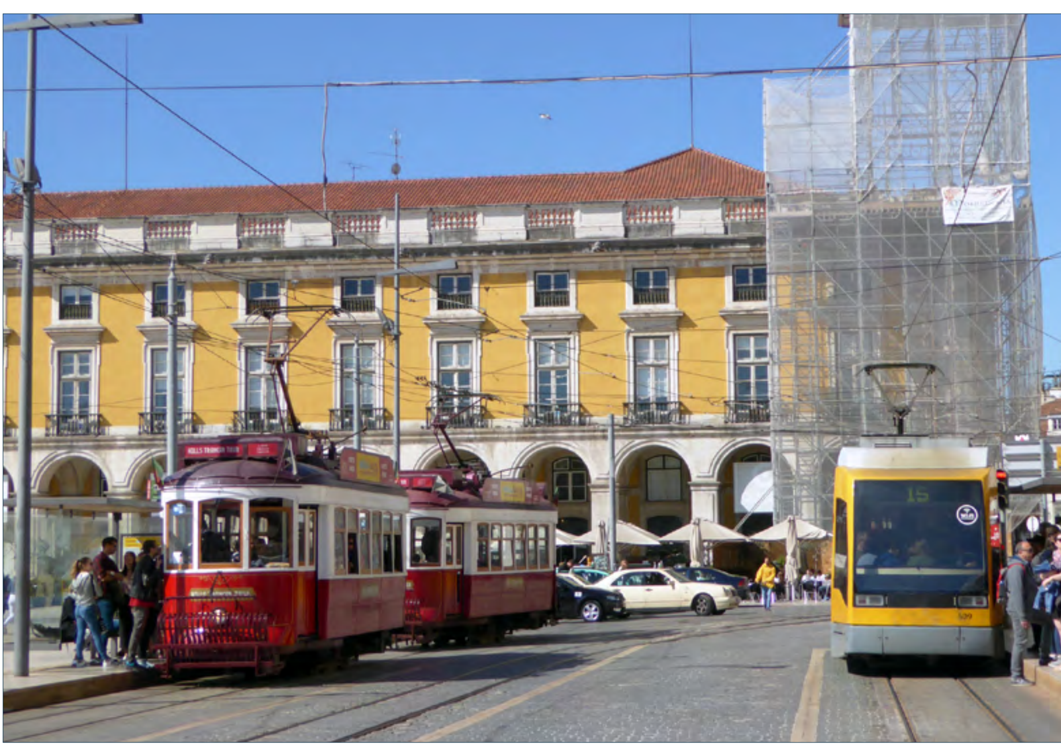
▶ On March 27th, a pair of tourist trams Nos. 6 (ex 585) and 11 (ex 569) load tourists, whilst Siemens articulated tram No. 509 waits to depart on a route No. 15 service to Alges, seen at Praca do Comercio, Lisbon.