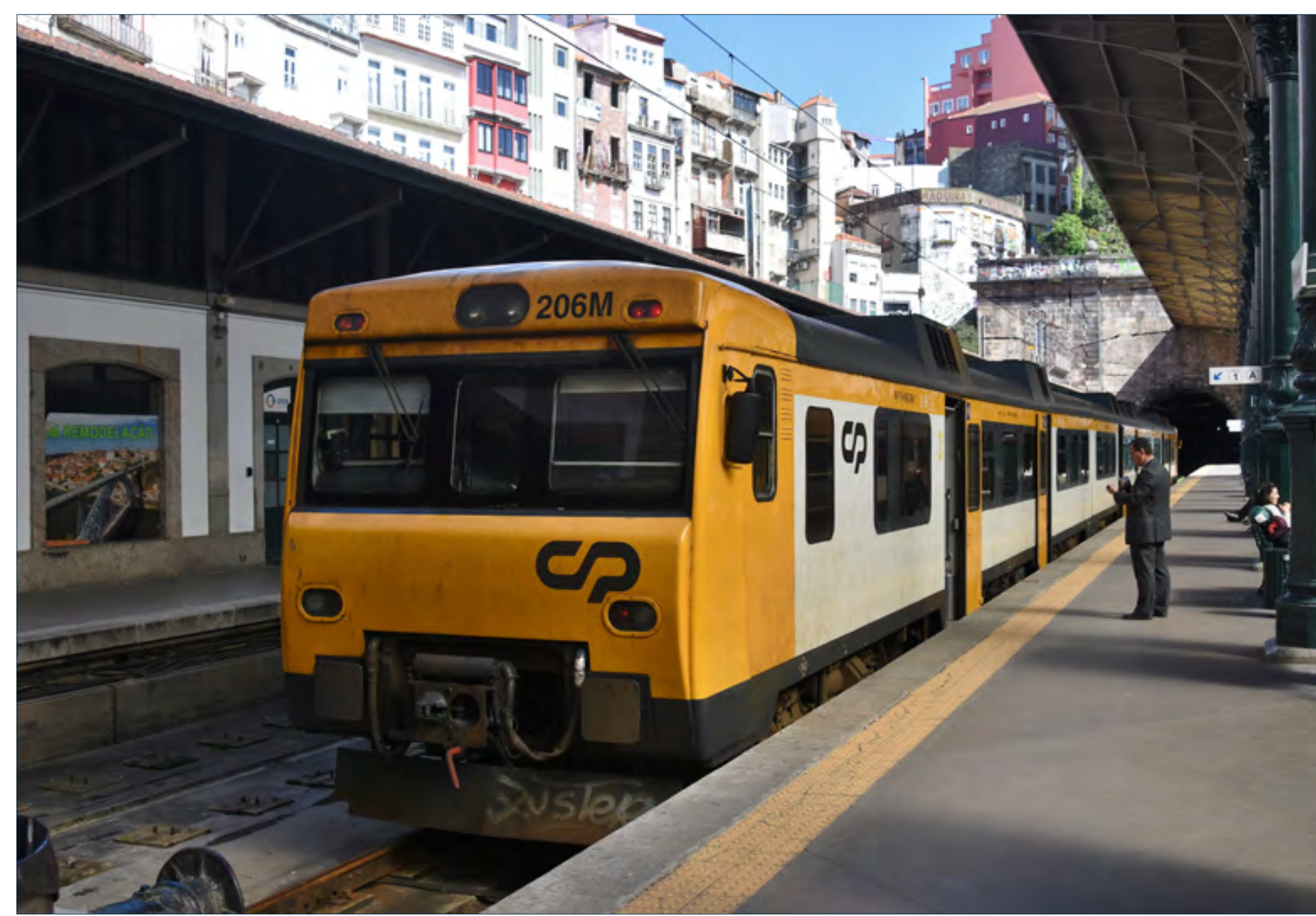
▶ Former RENFE 592 DMU No. 206 stands ready to depart Porto Sao Bento on March 26th with a service to Regua.