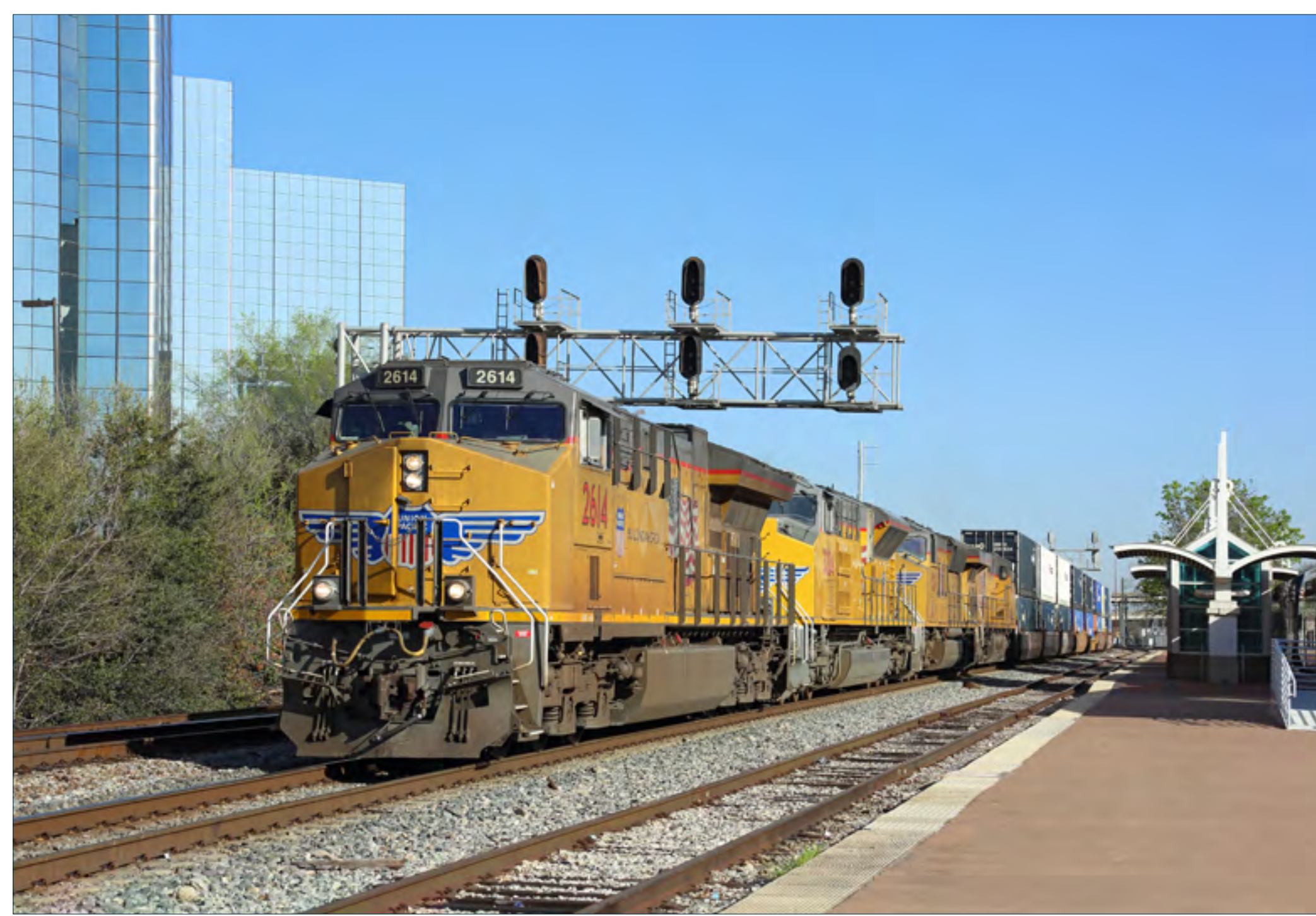
▶ UP Nos. 2614, 3024 (SD40-2), 5201 (SD70M) and 7797 (AC45CCTE) pass Dallas Union station whilst hauling a double stack container train on March 19th. Laurence Sly