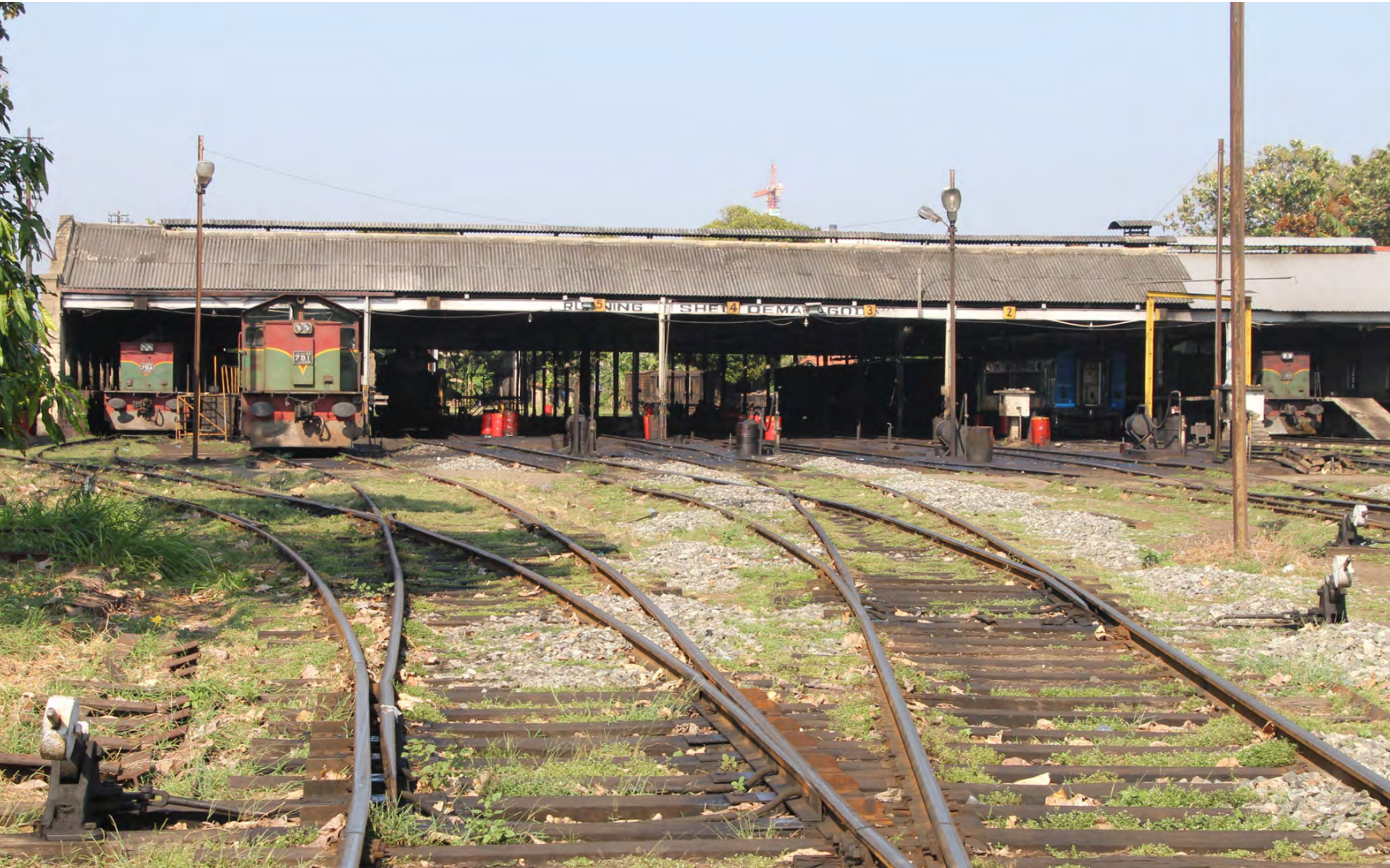
▶ A view of Dematagoda running sheds with Henschel-built M6 No. 791 and M6 No. 794 to left. Mark Enderby