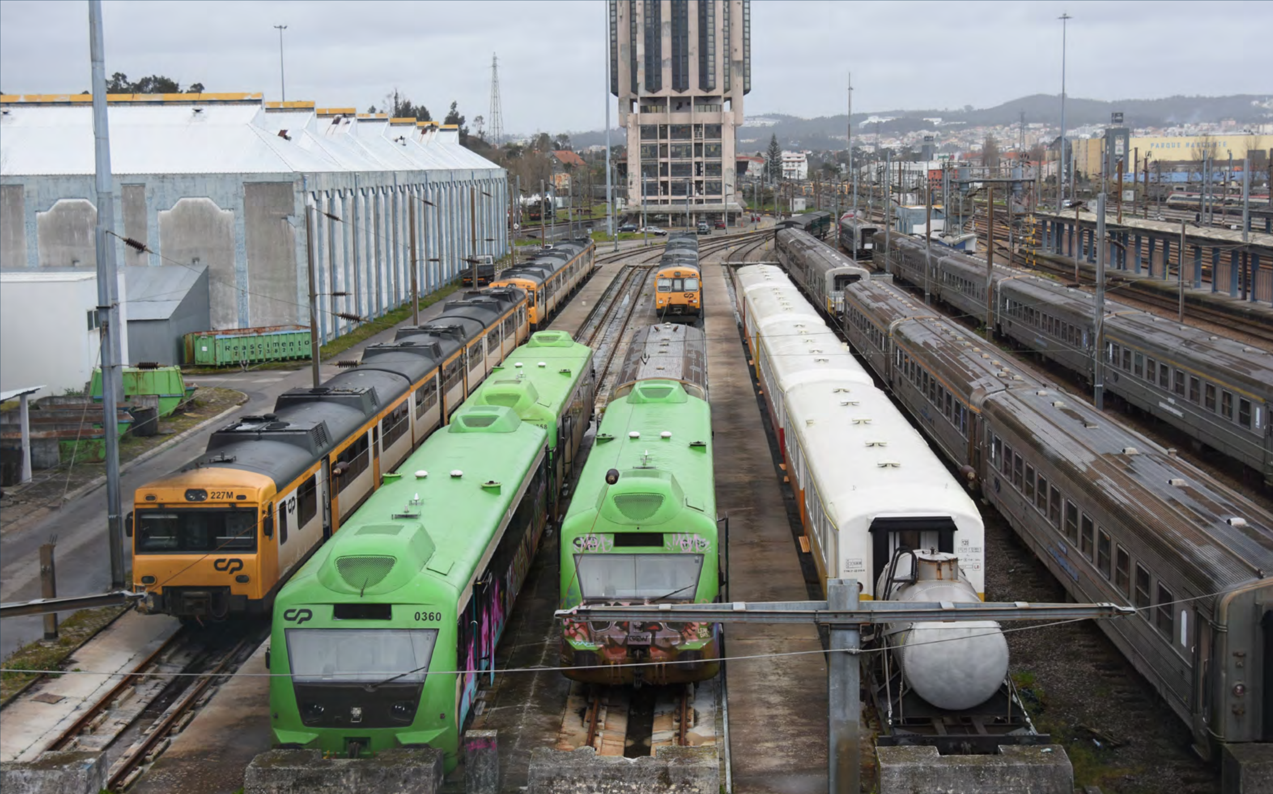
▶ A view of part of Contumil depot in Porto with rebuilt Allan railcars Nos. 0360 and 0365 and several ex RENFE diesel units present, March 24th.