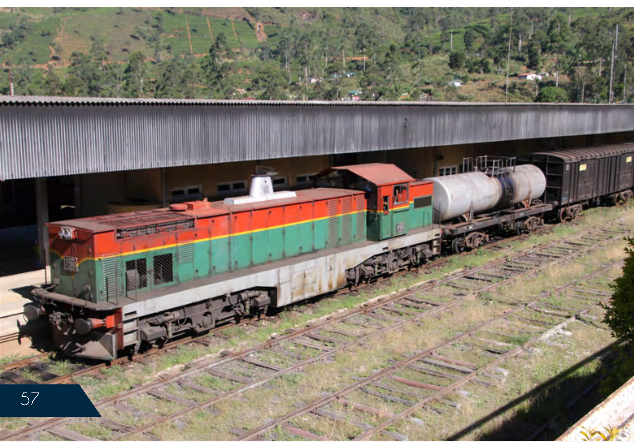
▶ Henschel M6 No. 790, with a mixed train, stands at Nanuoya on February 21st.