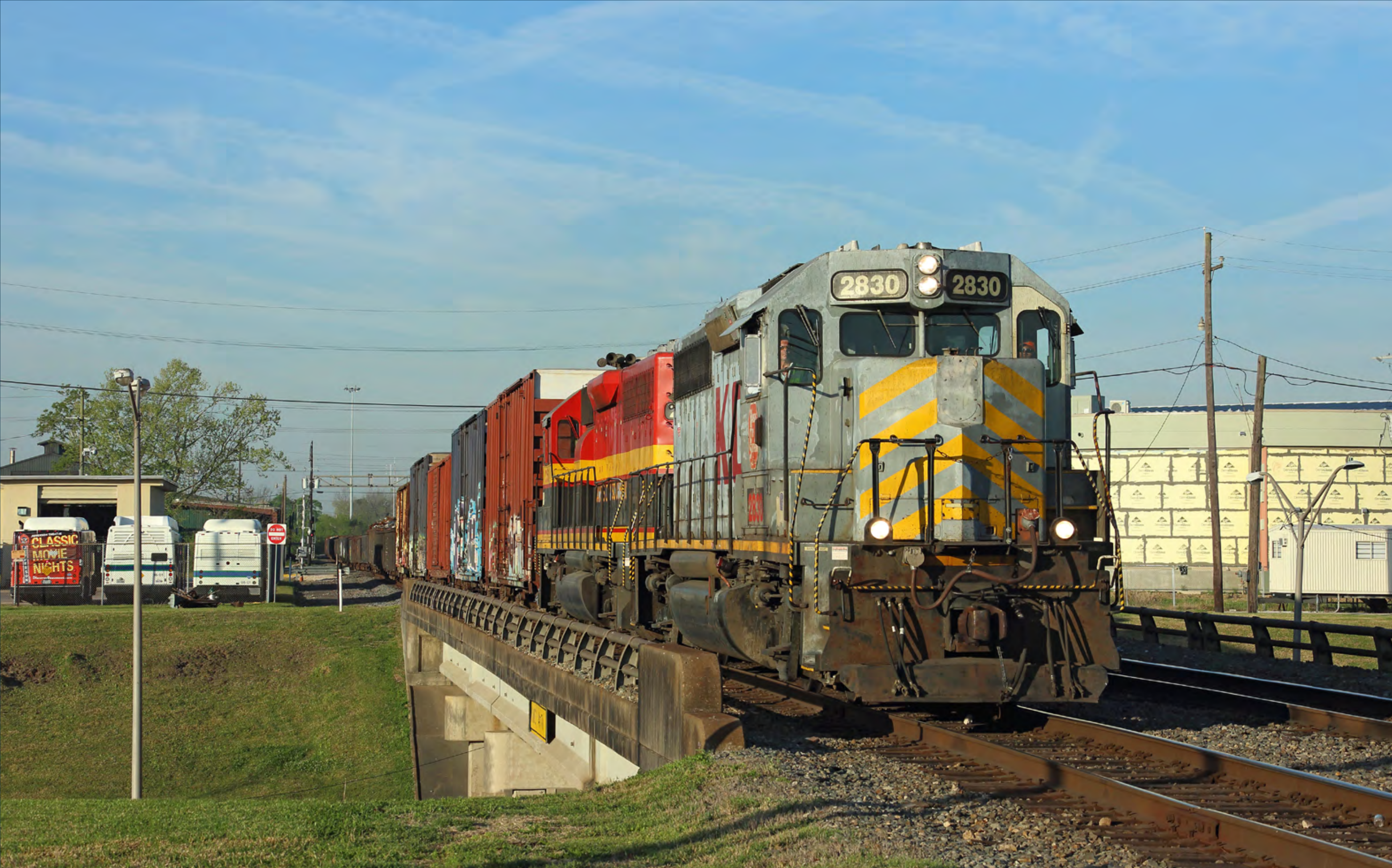
▶ KCS pair Nos. 2830 and 2852 (both GP40-3) pass Beaumont whilst working local industries train on March 22nd. Laurence Sly