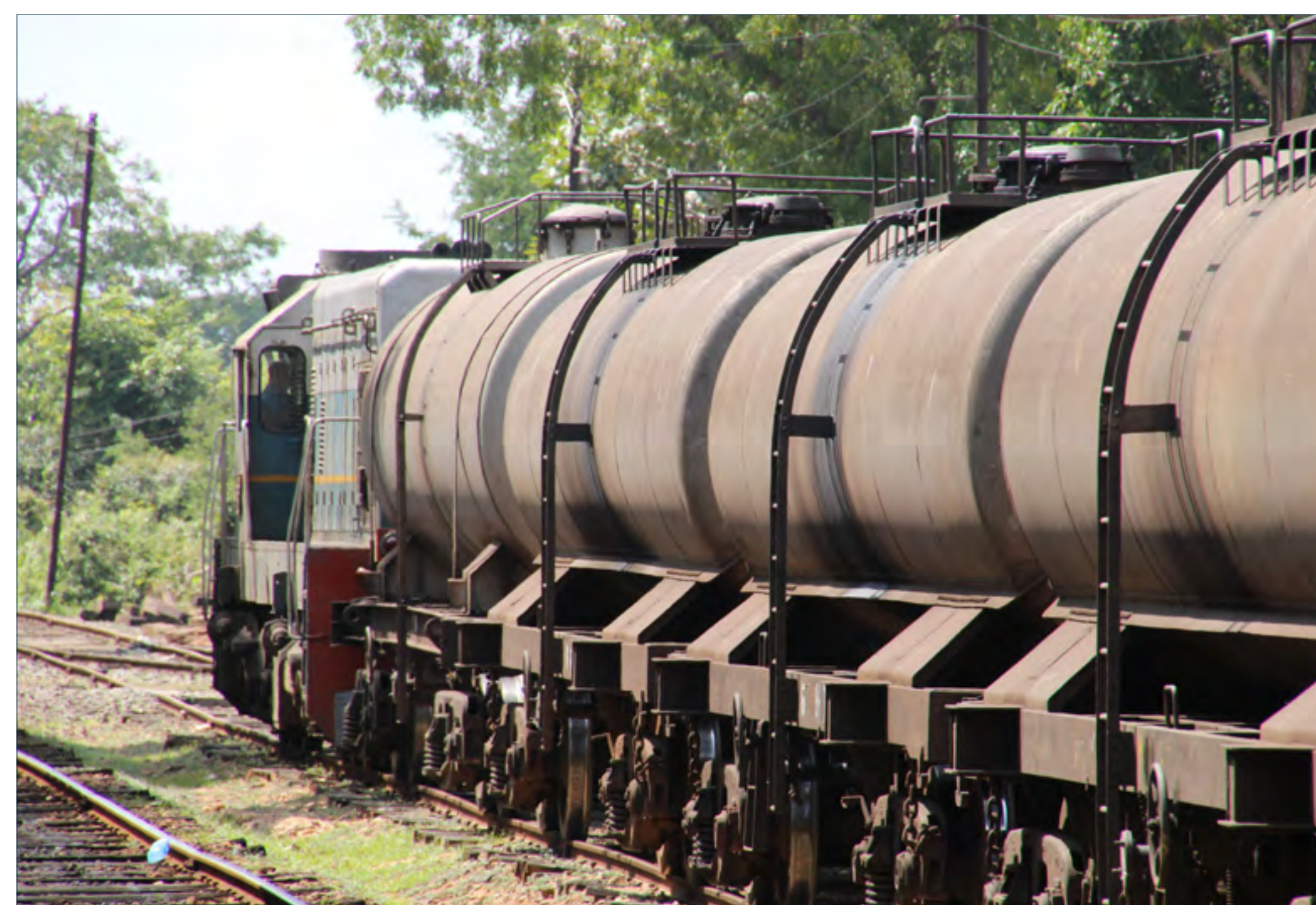
▶ GM M2 No. 628 heads a mixed train through Mannampitiya on February 23rd.