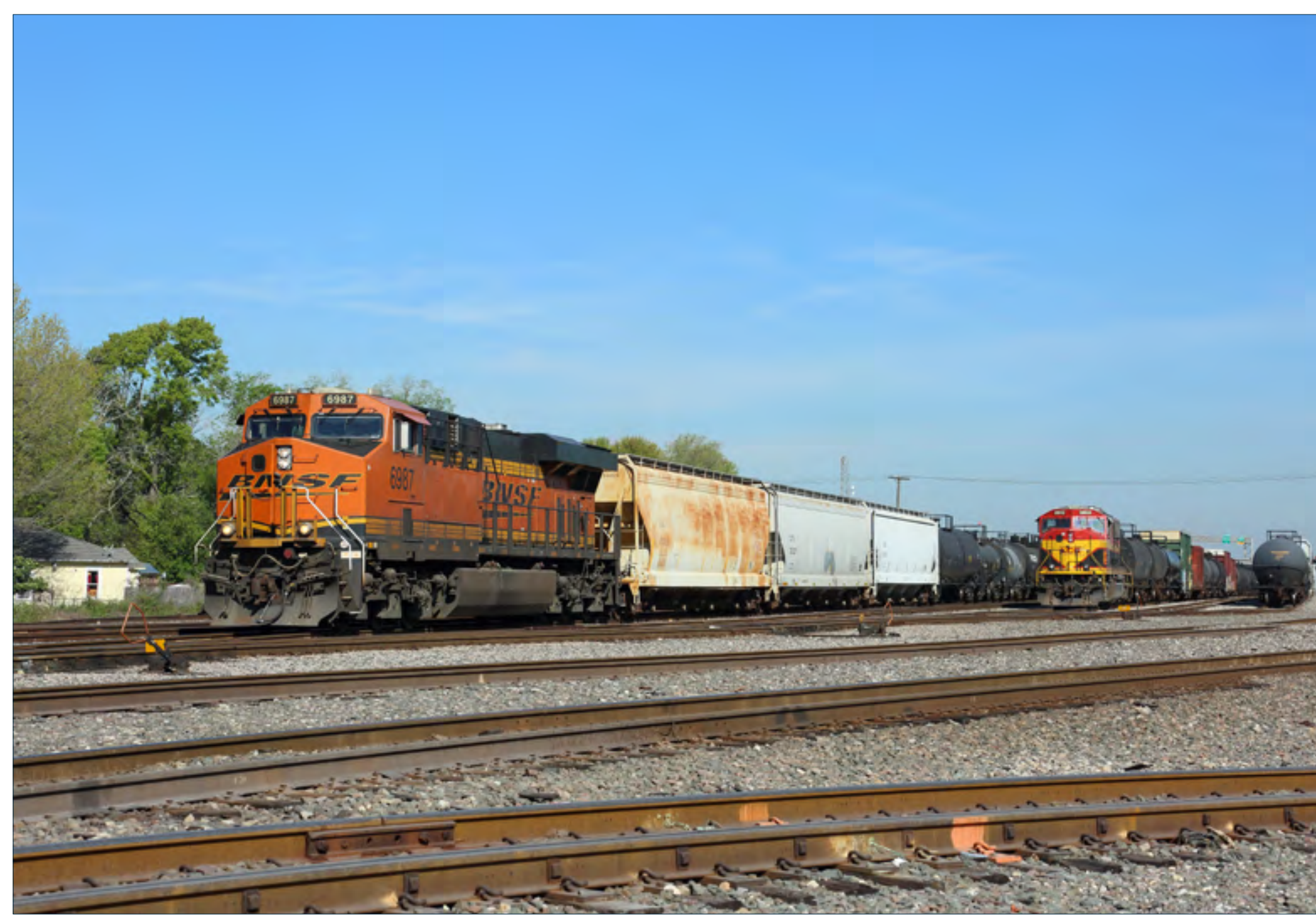
▶ BNSF No. 6987 (SD40-2) and KCS No. 3912 (SD70MAC) stand in the yard at Beaumont on March 22nd. Laurence Sly