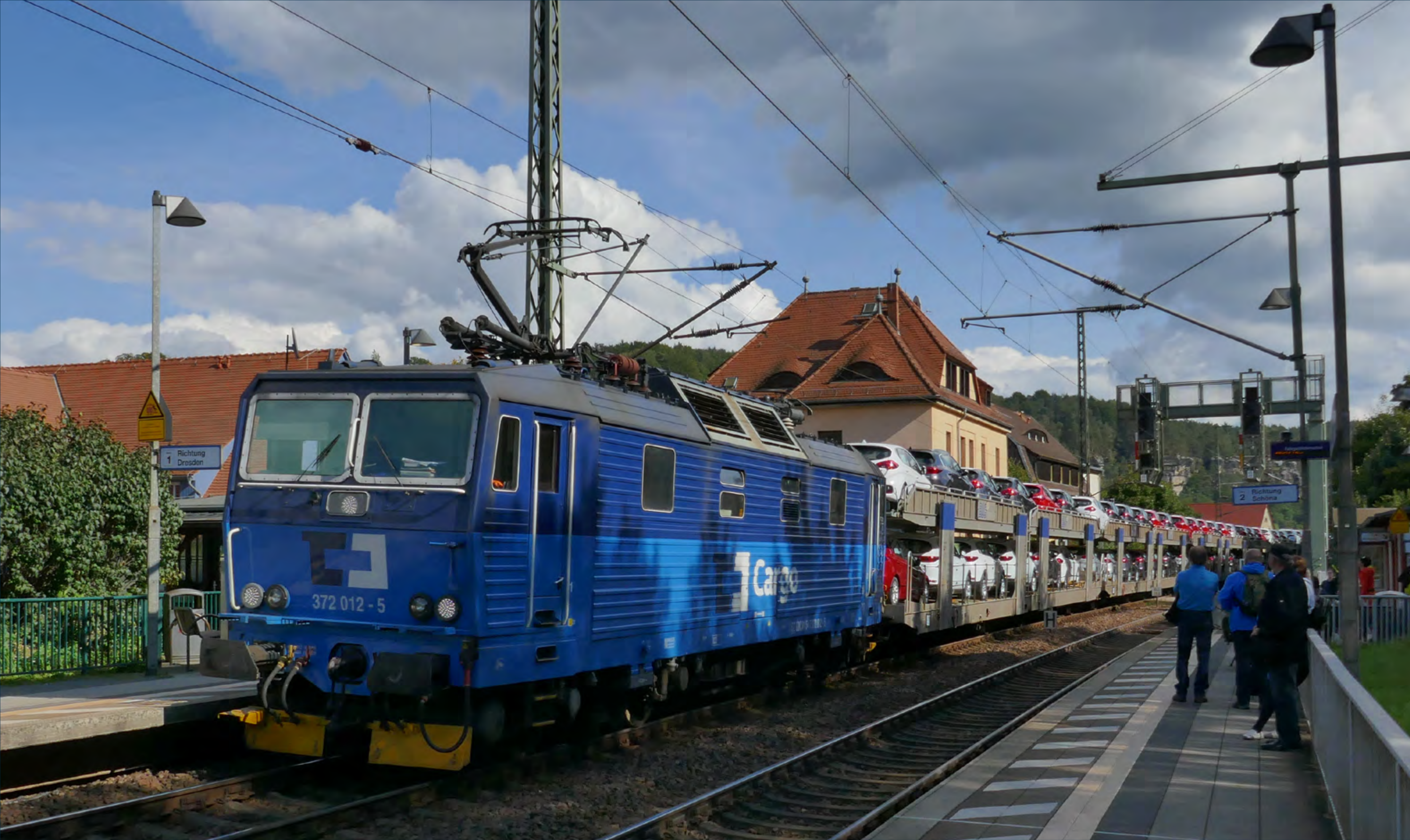
CD Cargo's Class 372.012 takes a northbound car train through Kurort Rathen. Steamsounds