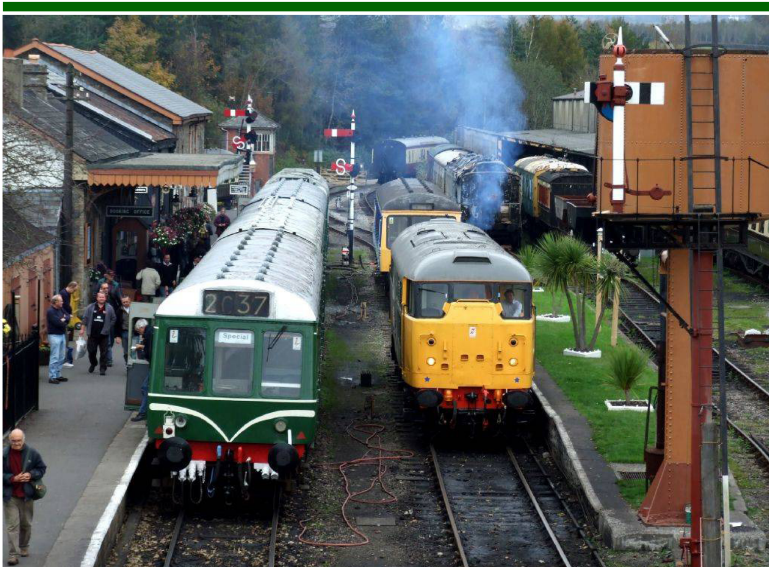
Above: At the beginning of November the SDR held a "Gronk Aid" gala. This is resident Class 31108 at Buckfastleigh.