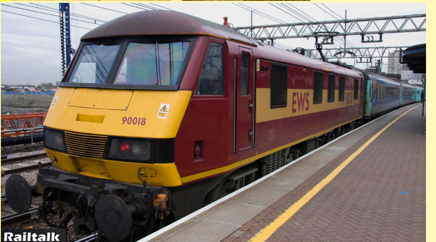
Bottom: Regular Class 90 operations in the "One" region are currently supplemented by EWS hire-in locos. 90018 works a service from Liverpool St. - Norwich on the 24th November, seen here at Stratford.