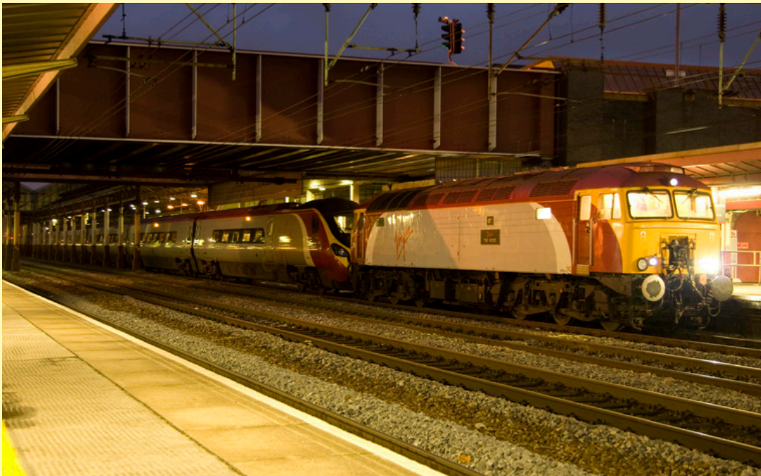
Middle: Highlight of regular Class 57 workings during November has been the weekend West Coast drags between Crewe and either Preston or Liverpool, both diverted via Manchester. This is 57312 about to depart Crewe on the 10th November.