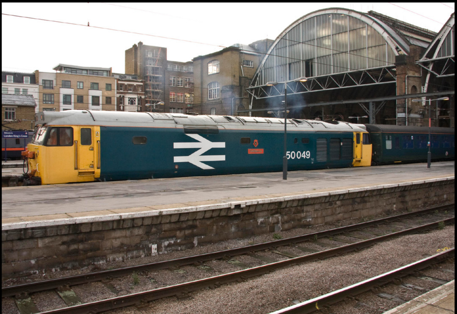
Above Class 50 workings out of London Kings Cross are fairly uncommon, even nowadays. So when we heard of this charter to York, we made sure that we were there. This is 50049 working the 1Z50 Kings X - York on the 24th November.