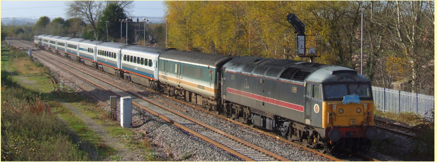
Top: 47703 passes Norton Fitzwarren on the 9th November with the 5Z43 Laira - Neville Hill returning the MML HST set that FGW had on short-term hire during the refurbishment for their own fleet.