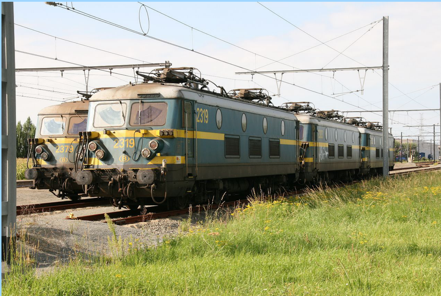
Brian Battersby continues his journey in Europe this month with some more examples of how diverse the trains seen can be, no uniform liveries over there!

Above: A group of Belgium Railways Class 2300's can be seen here at Zeebrugge. Brian Battersby