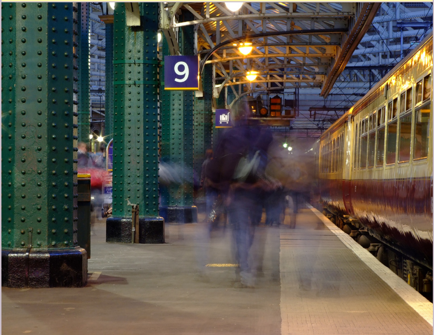
Above: Commuters alight at Glasgow Central from Class 156 507 which brought in the 16.05 2A89 Barrhead - Glasgow Central service. Below: A long exposure shot of Class 314 216 going through into Glasgow Central High Level Station working the 16.00 2O18 Glasgow Central High Level - Glasgow Central High Level via Queens Park Service on the 2nd November.