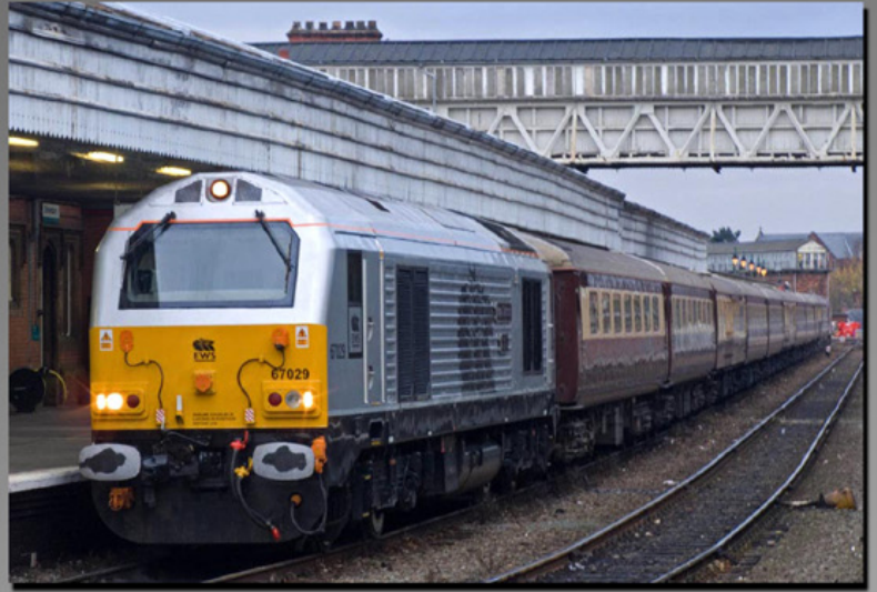
Above 67029 Worked the 1Z97 Shrewsbury - Carlisle Northern Belle seen here at Shrewsbury on the 10th November.

Welcome to the December issue of Charter Scene, as part of Railtalk Magazine. Charter Scene aims to document charter movements during the month, although we need your help. If you have any images or records you would like included please contact us via the usual address.