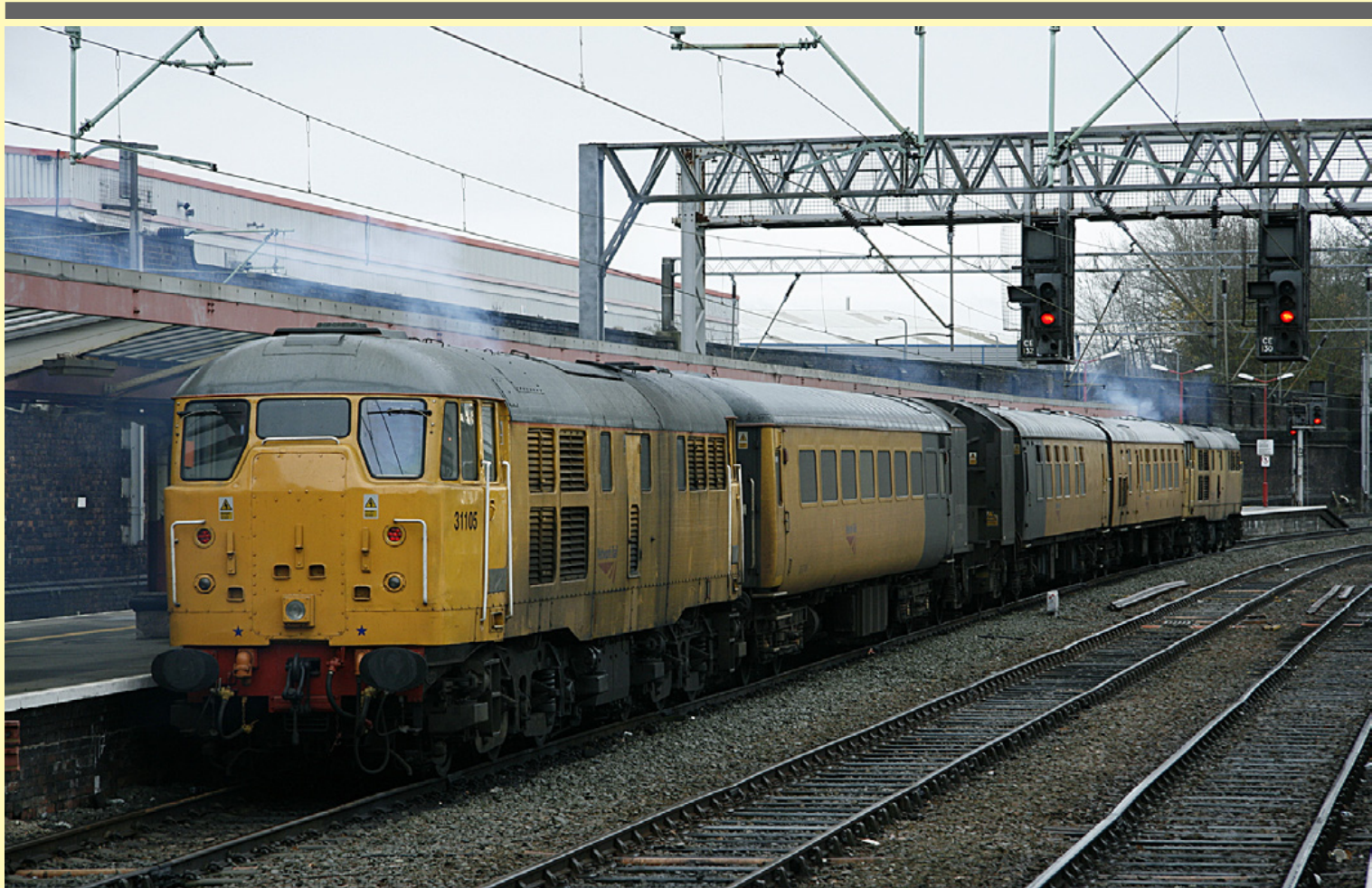
Two Views of Crewe, reliving the locos of yesteryear, that somehow don't go away.

Above: 31105 leads a Network Rail infrastructure train into the little used platform 2. Richard Hargreaves