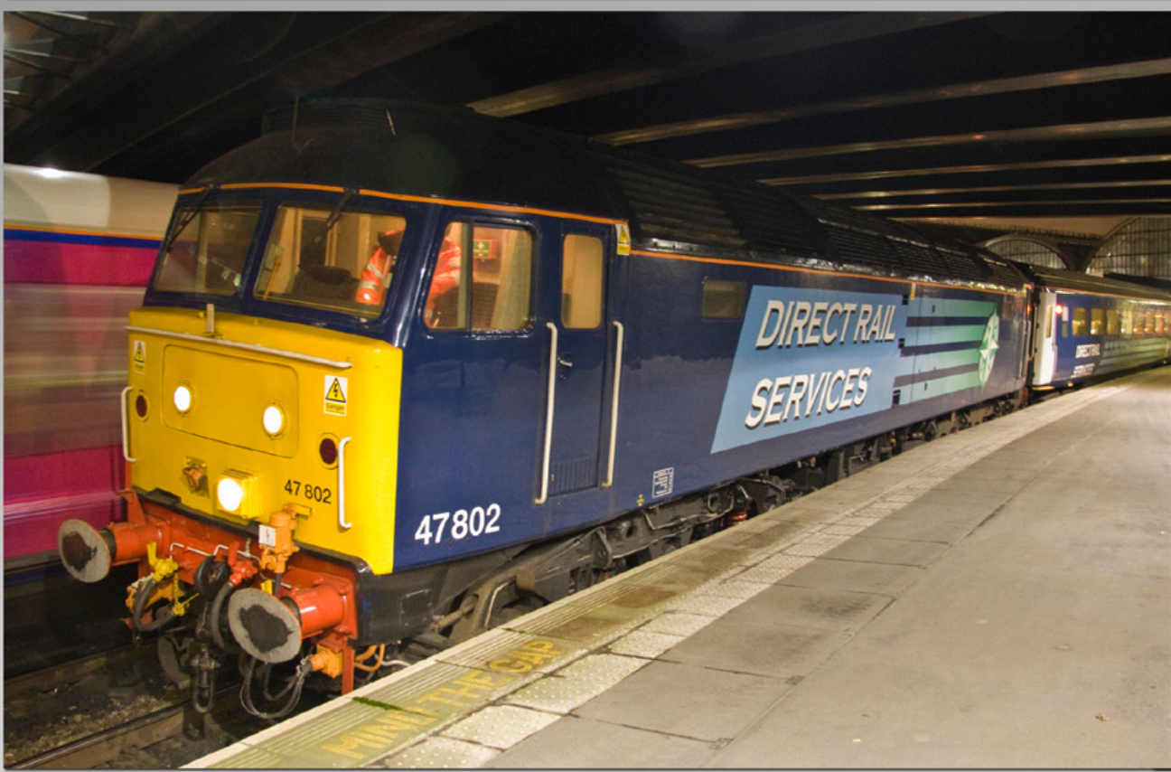
Left Making a welcome return to the charter market is DRS, who have taken on Victa Westlink's charter 47802 waits at Paddington with the ECS off the 1Z53 Ludlow - London Paddington on the 24th November