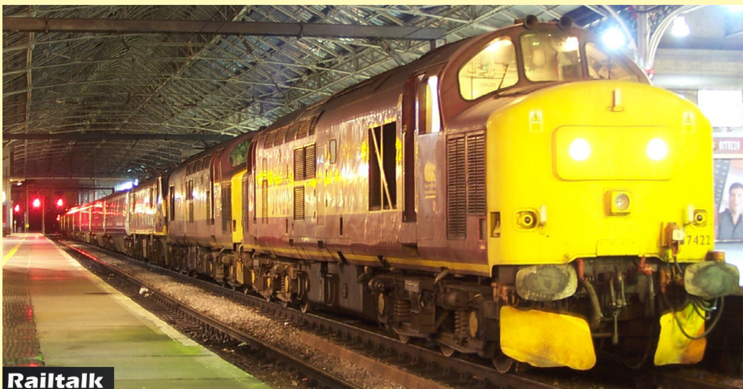
Below: Working of the Year #2, 37422 and 37417 on the 1S26 Northbound Sleeper, seen here at Preston on the 26th November.