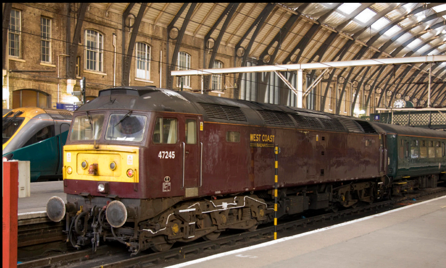
Above 47245 arrives at London Kings Cross with the 5250 ecs on the 24th November. Dave36