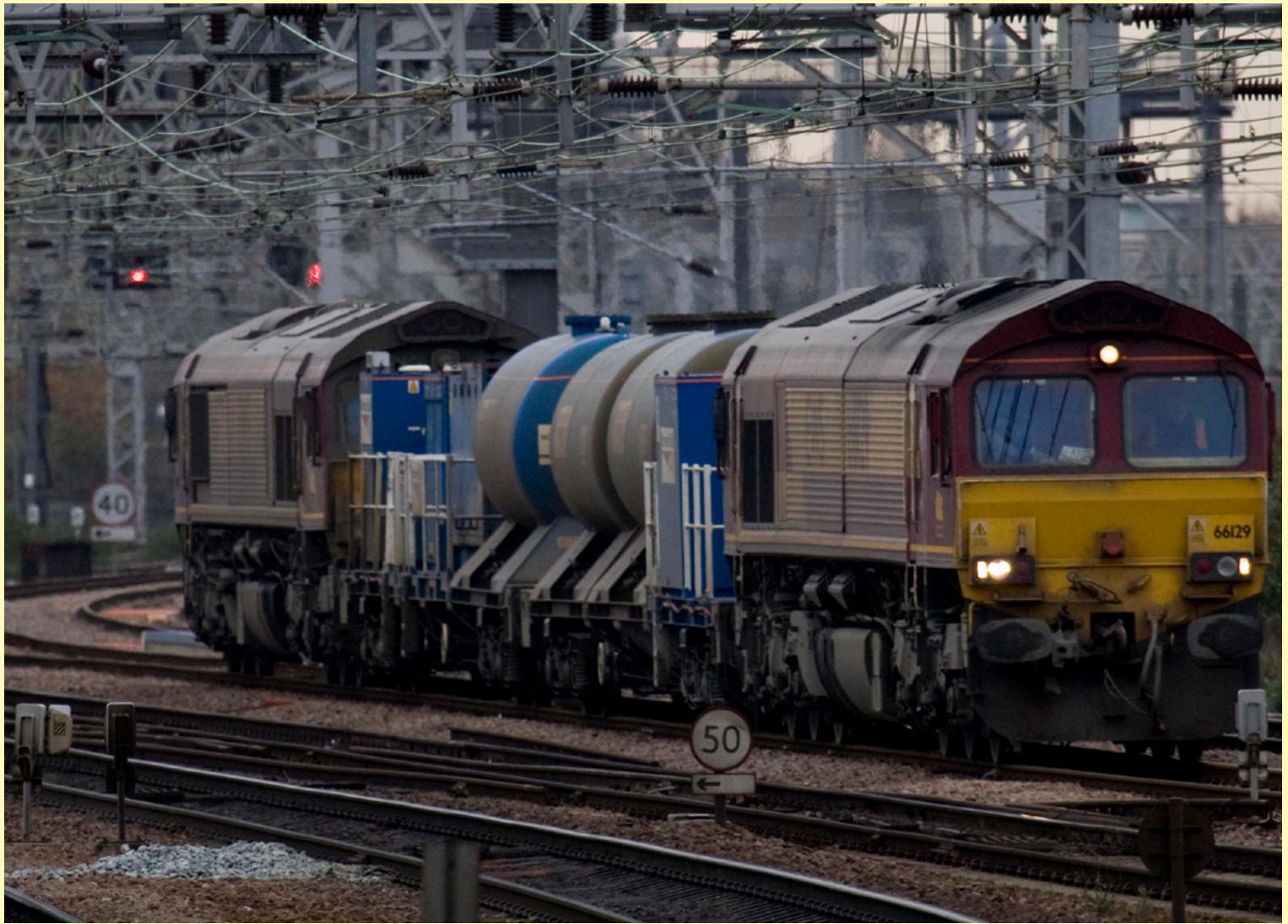
Above: We continue this month with a look at the RHTT services around the country, EWS have the contract for most of the services around North London, and this is 66129 approaching Stratford. Class 47