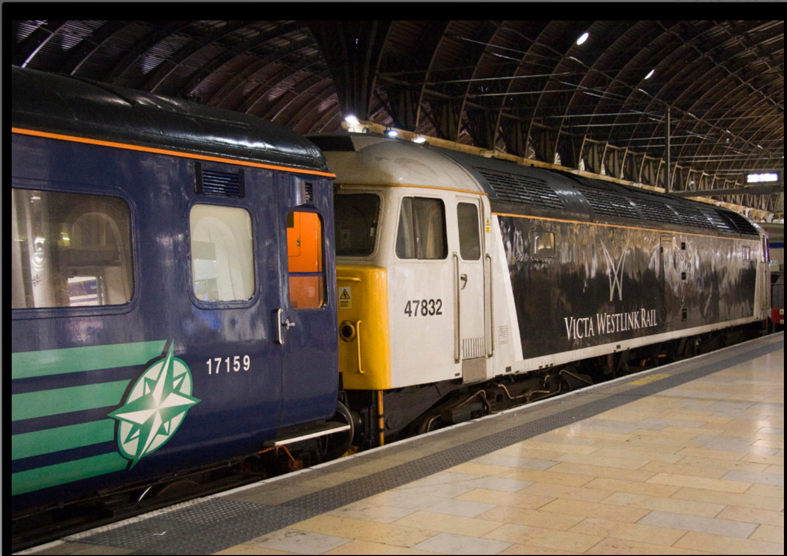
Above How much longer for this livery? 47832 just arrived at Paddington with the 1Z53 Ludlow - London Paddington return charter. Class47