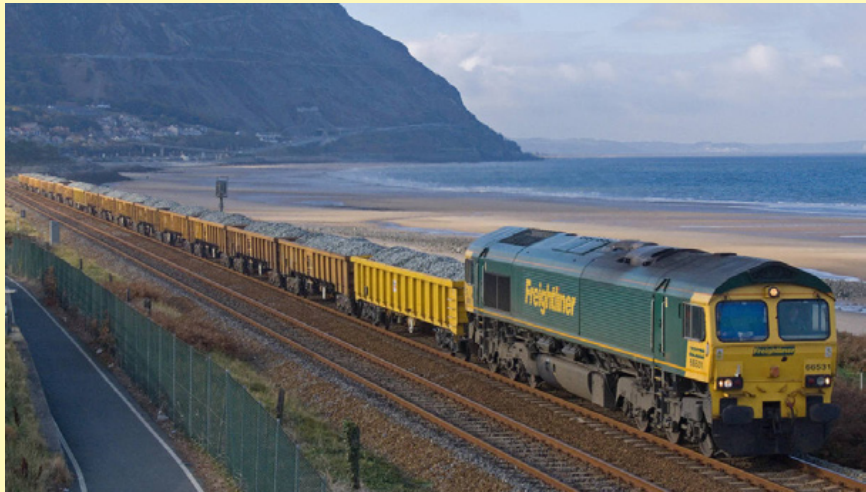
Above left: Interesting shot where the camera has been focused on the sign rather than the unit, A Class 321/9 approaches Doncaster. Ian Furness Top right: The future of Trans-Pennine! Class 185 114 is seen departing Glasgow Central on route learning duties running as 13.09 5N22 Glasgow Central High Level - Blackpool North. 15th November. Jonathan McGurk Middle right: Autumn sunshine catches 66531 working the 6K22 Penmanmawer - Crewe on the 2nd November. Carl Grocott Below: Making a welcome return to the mainline in November is 37422, which had been sidelined at Wigan for a while, seen here back on the North Wales Coast, where for so long of its life was spent. Mike Byrne