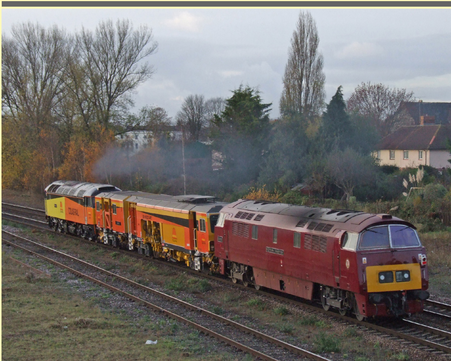
Above: Working of the Year #1, 47727 and D1015 work the 6Y52 on the 22nd November seen here leaving Taunton whilst working from Westbury to Tavistock junction. The 47 & Western having worked from Eastleigh to Westbury earlier in the day. 'Western Champion' was enroute to Laira depot, Plymouth for tyre turning.