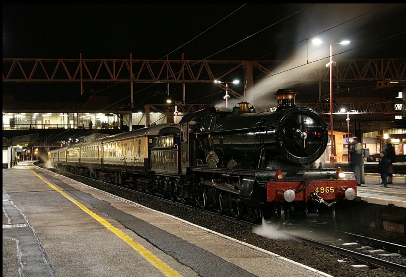
Below Great Western 4965 pauses at Stafford whilst working the 1237 Chester - Tyseley return charter on the 24th November.