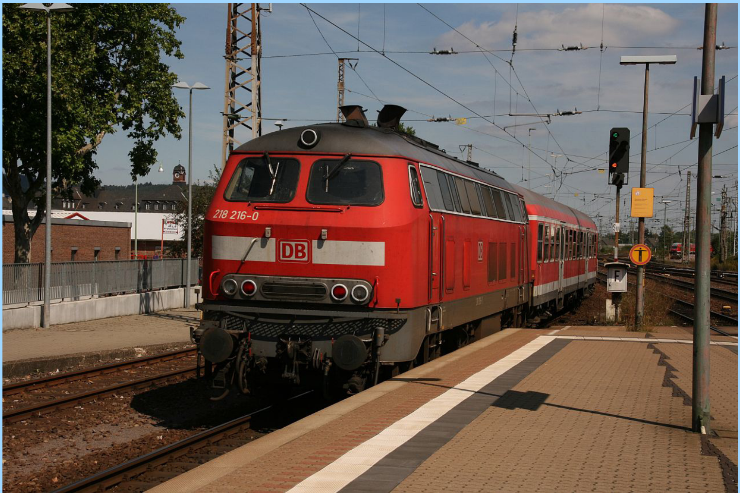
Above: The DB livery has changed very little over the years most German trains are red and grey, but the variety is increasing, 218 216 at Trier. Below: One of the fairly new operators, Rail4Chem 185 572 passes through Neuwiedh.