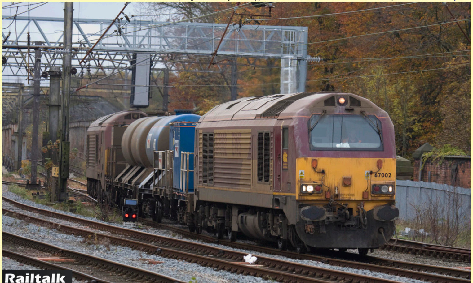
Below: Class 67's work the RHTT trains in the North West of England, A dirty 67002 approaches Preston, where the train will stable for the weekend. Andy