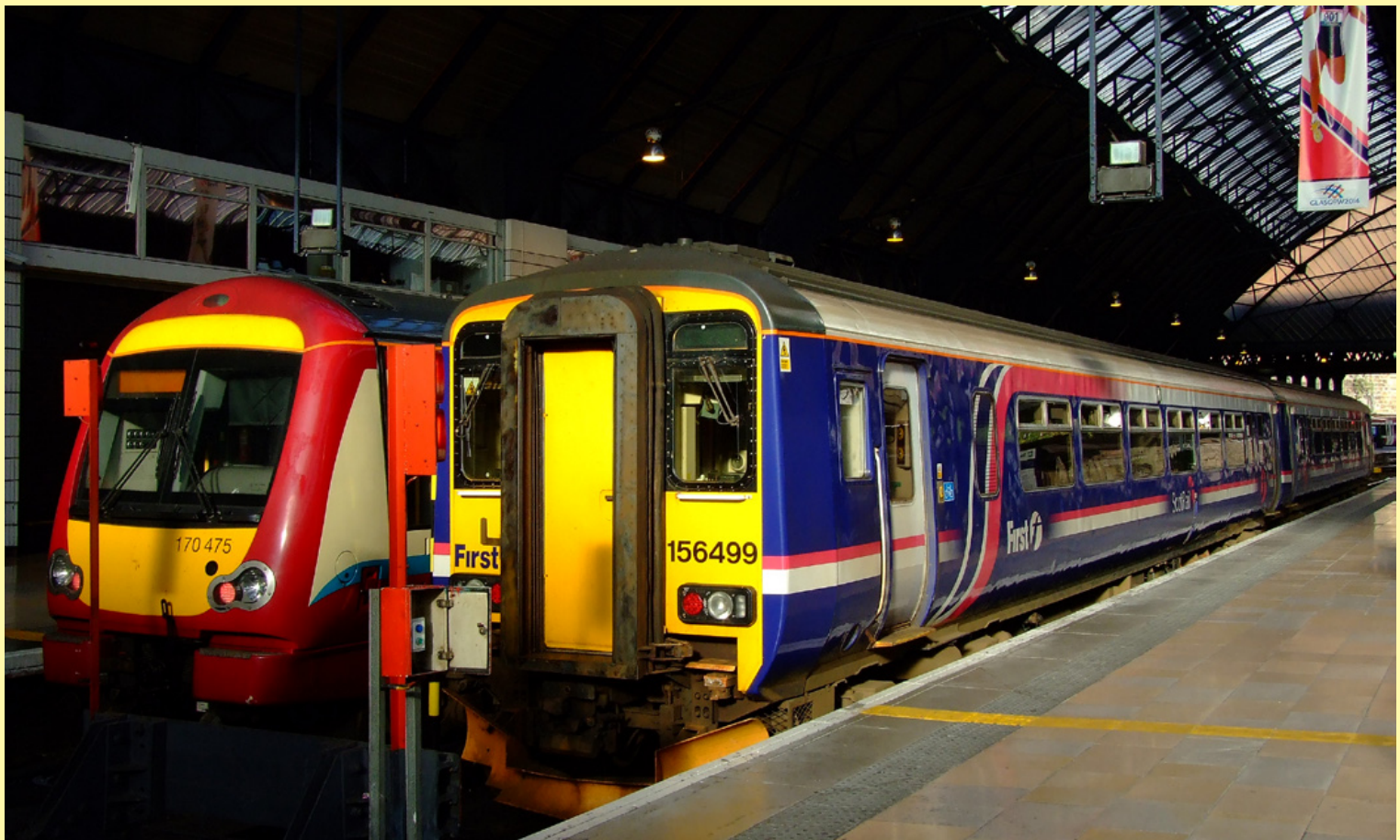
Above: In glorious sunshine Class 170 475 and Class 156 499 are seen inside Glasgow Queen Street High Level on the 7th November. Below: Catching the late afternoon sun, 59201 leads 66170/227/117/080 past Norton Fitzwarren on 12 November whilst working light from Tavistock Jn to Westbury. The locos had been used on engineers trains in South Devon the previous weekend.