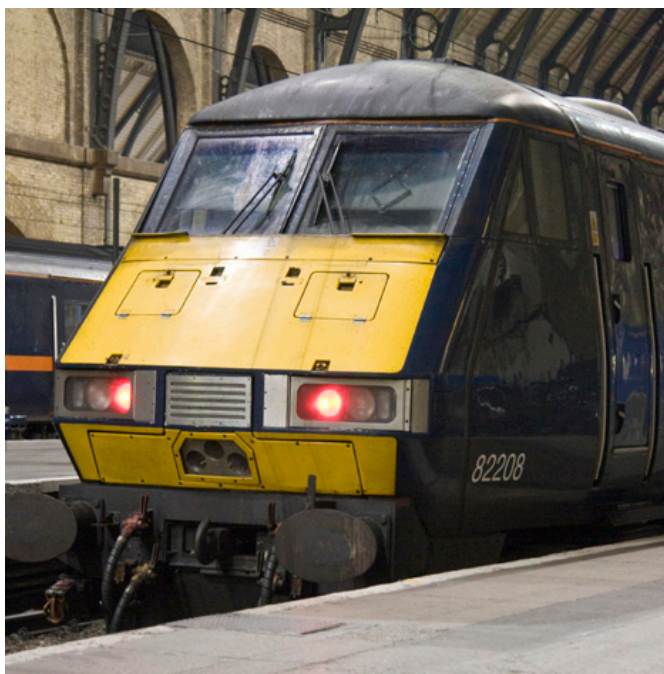
With debranding now taking place, most GNER stock are getting white numbers and white stripes replacing the bodyside red bands.

The CBS Outdoor gallery will feature a series of special exhibitions throughout the year and the 120-seat Cubic Theatre provides a state-of-the-art educational facility for life-long learning.