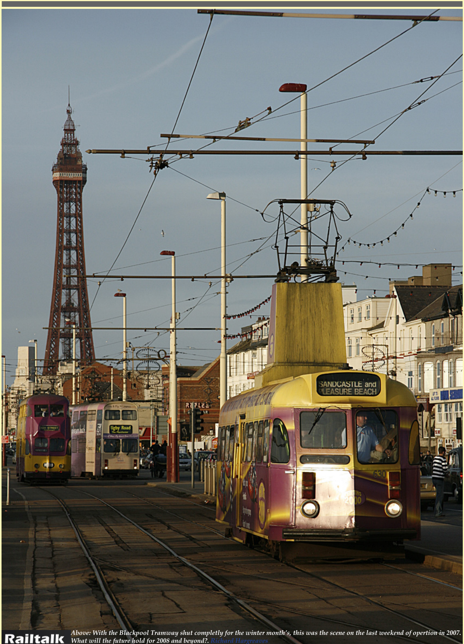
Above: With the Blackpool Tramway shut completely for the winter month's, this was the scene on the last weekend of operation in 2007. What will the future hold for 2008 and beyond?. Richard Hargreaves