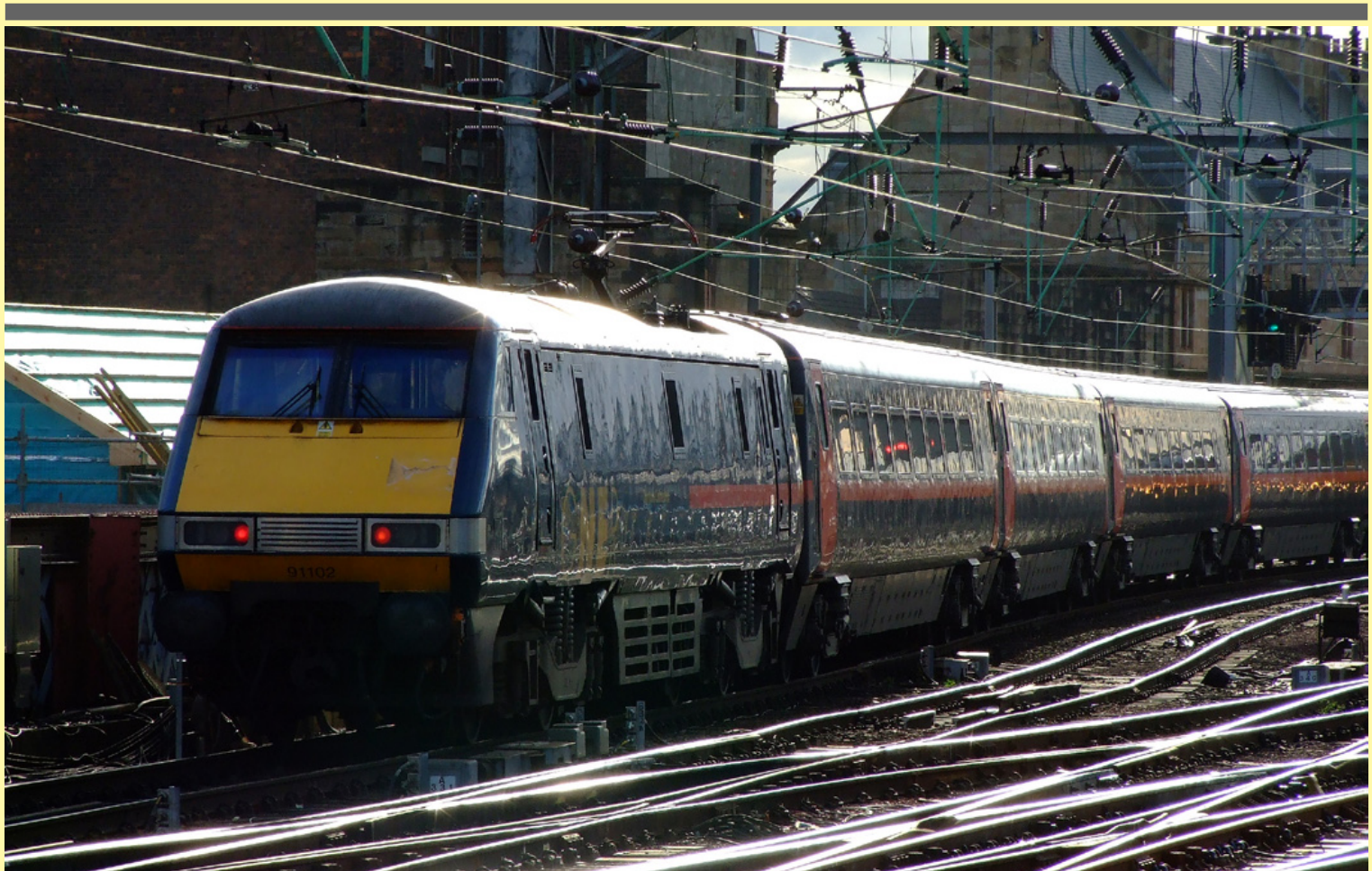
Above: With the GNER franchise about to end, the stock is slowly getting debranded. The stock is receiving lower white numbers and the 91's and DVT's have gained numbers on their ends. Class 91 102 is seen departing Glasgow Central High Level Station in excellent full sun working the 12.00 1E15 Glasgow Central - London Kings Cross service. DVT 82 217 was leading. Below: Virgin Trains has been utilising the Class 57's to capacity on weekends in November, with many diversions along the West Coast main line. 57310 pauses between turns at Crewe on the 10th November.