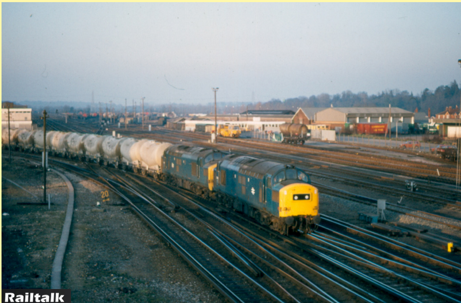
Below: On 18 Feb 1984, I was on the road bridge at Eastleigh with my camera and I was fortunate enough to witness a double headed "37" arrive on a cement train from Westbury, 37 123 and 37 187 seen arriving coming off the Romsey line. In 1984, the line from Romsey was freight only and was used to avoid having to take freight trains through the very congested Southampton Central. David Mead