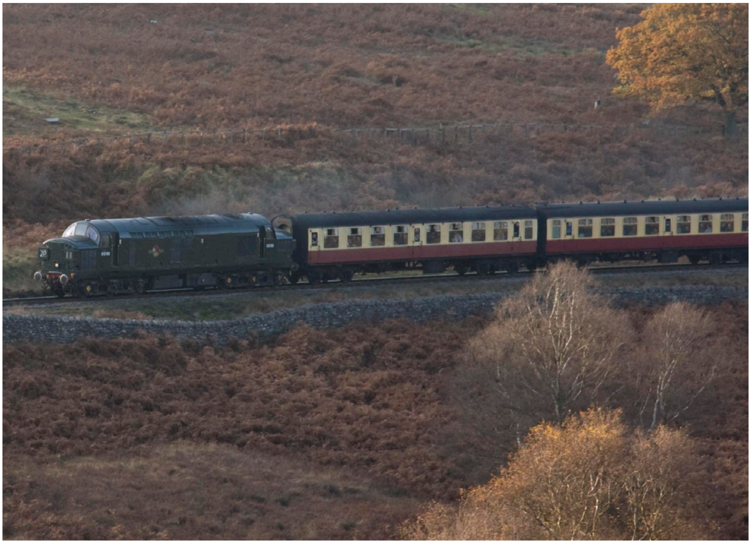
Above and Below: In early November the North Yorks Moors Railway held a gala to raise funds for the Severn Valley Railway's Flood Appeal. The NRM's Class 37, D6700 was one of the attractions, as was 60007 Sir Nigel Gresley, both seen here near Goathland. Class47