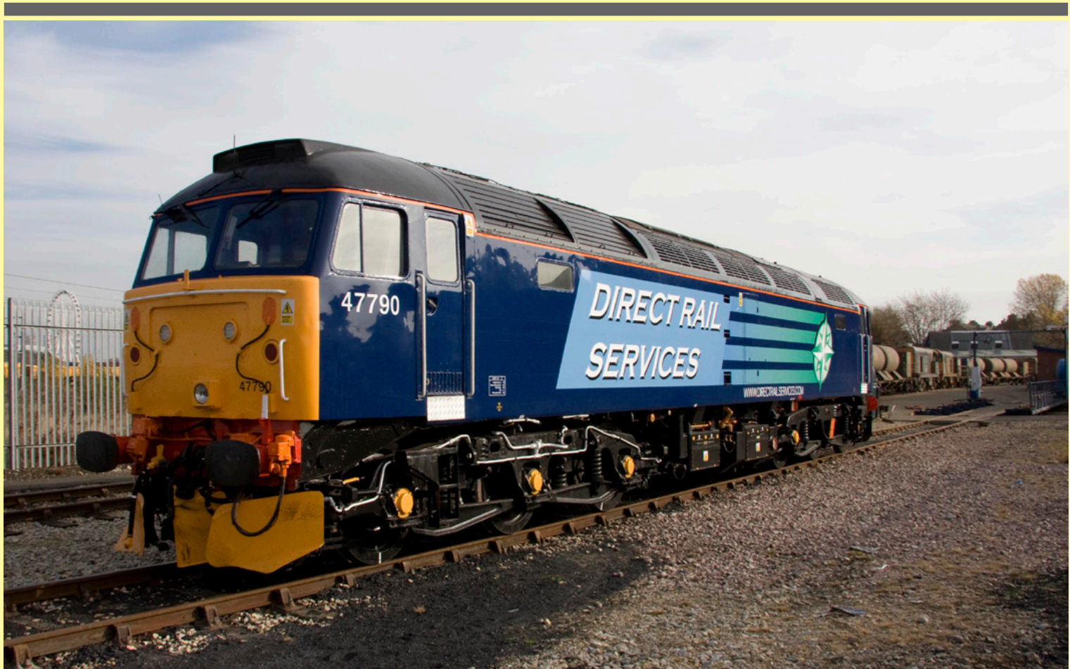
Above: Whilst one of the regular Class 20's based at York was sent to Crewe for repairs, DRS sent newly reinstated 47790 as cover. Below: 37194 and 37688 work the 3J96 Holyhead - Crewe RHTT passed Llanddulas on the 2nd November.