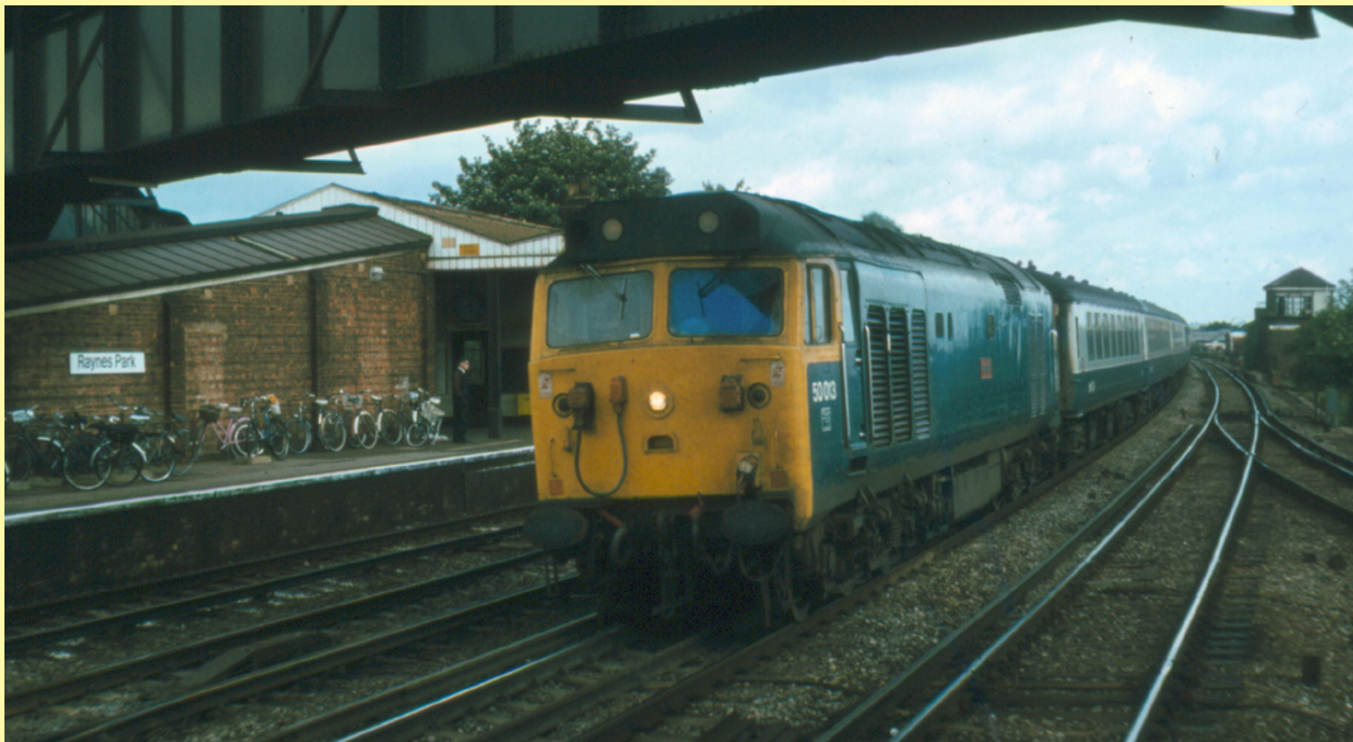
Above: Class 50 power. For a short period I was fortunate to work in the General Offices at Waterloo Station and often took the camera to work. I was able to go to places in my lunch break - although trips to Raynes Park from Waterloo often required more than the official 50 minutes allowed!!! The Class 50's were great for haulage - as they were very noisy machines! Nevertheless, they were prone to overheating problems and failures, especially on the stopping trains, as the locos were not designed for stop-start journeys. But they were powerful and very useful for the gradients on the Salisbury-Exeter line. Here, on the 18 Sep 1981 we see 50 013 Agincourt on 13.10 Waterloo - Exeter SD passing Raynes Park. David Mead