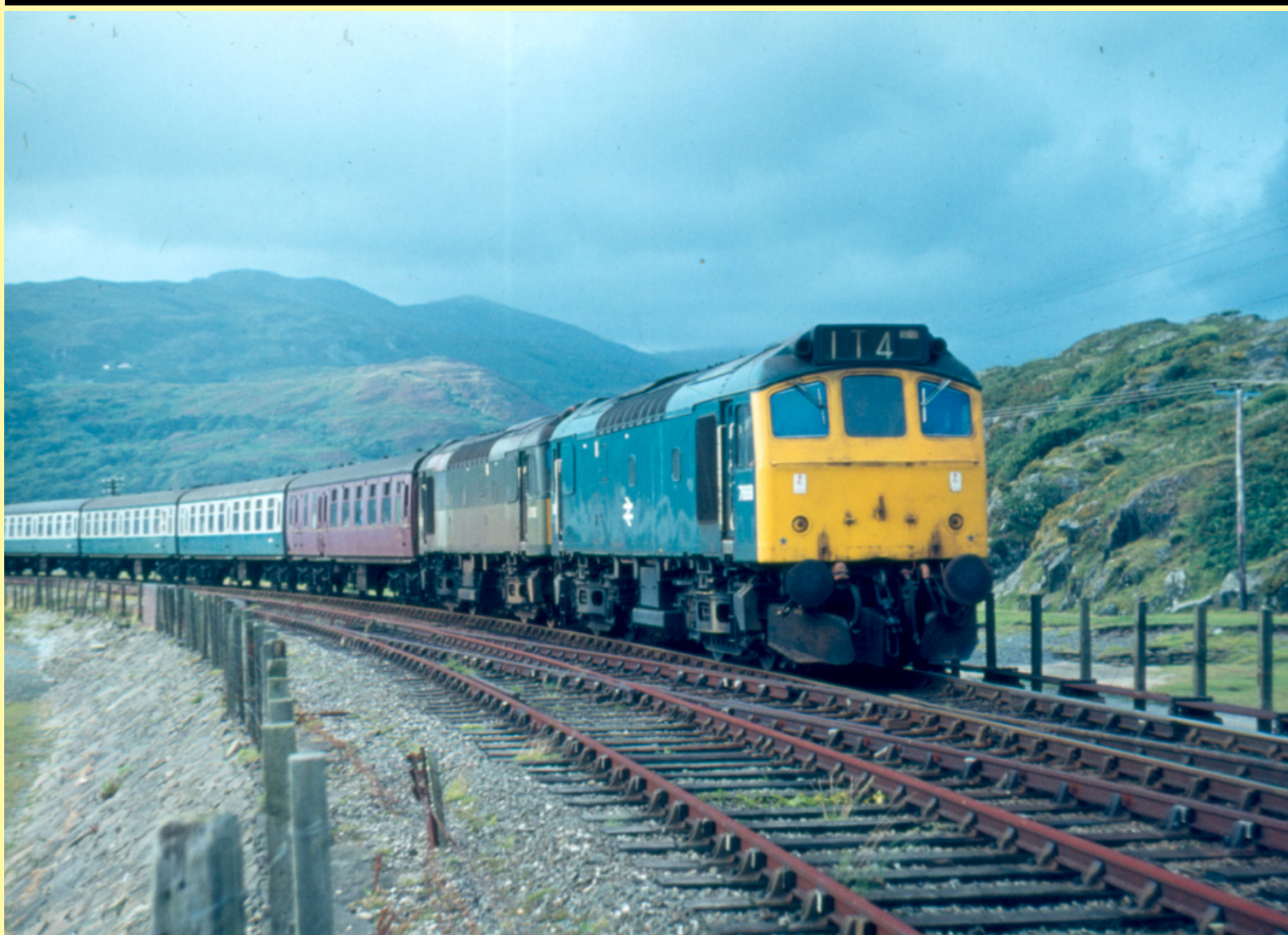
Above: 30 Aug 1971 and D7668 and D7657 work the 17.50 Barnmouth - Loughborough return special, approaching Morfa Mawddach. Below: 27th July 1968 Bo-Bo E26032 at Manchester Piccadilly with a Sheffield Victoria train..