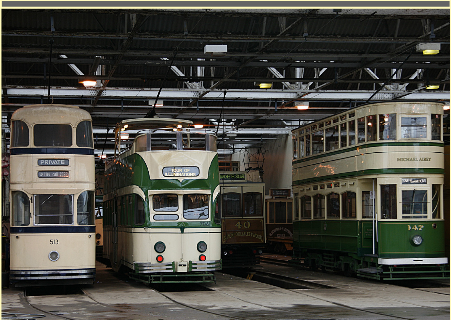
Above: The various different types of tram still to be found at Blackpool, is well illustrated in this line up at Rigby Road depot. Richard Hargreaves