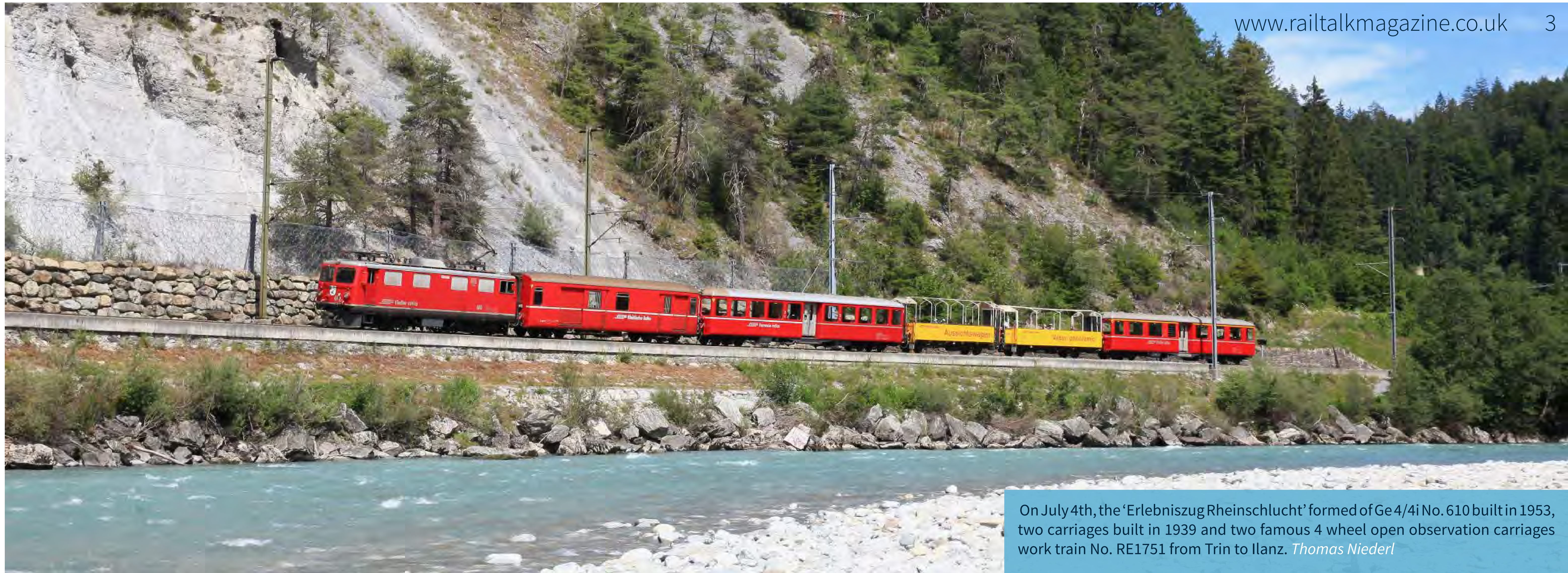
On July 4th, the 'Erlebniszug Rheinschlucht' formed of Ge 4/4i No. 610 built in 1953, two carriages built in 1939 and two famous 4 wheel open observation carriages work train No. RE1751 from Trin to Ilanz. Thomas Niederl