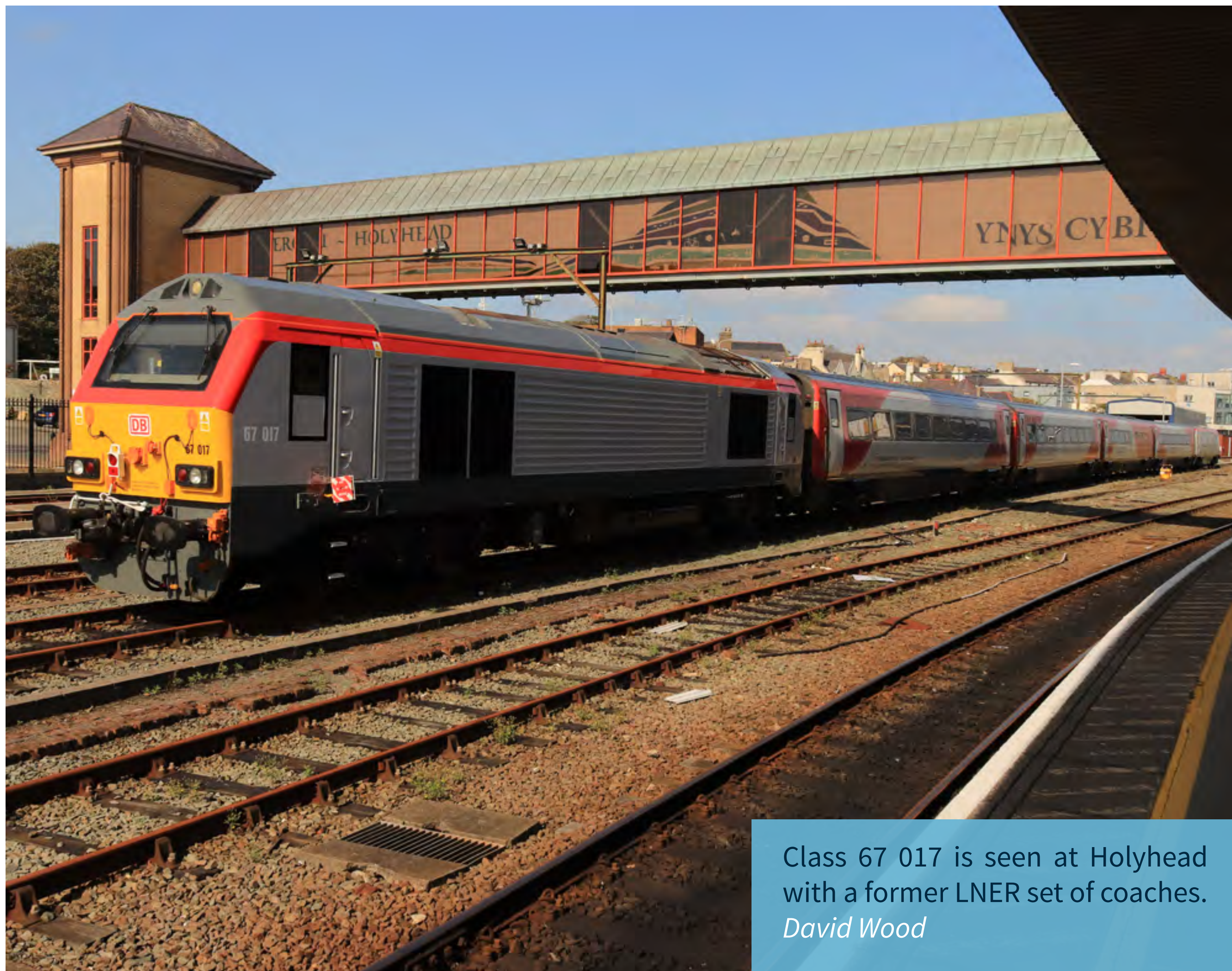
Class 67 017 is seen at Holyhead with a former LNER set of coaches. David Wood