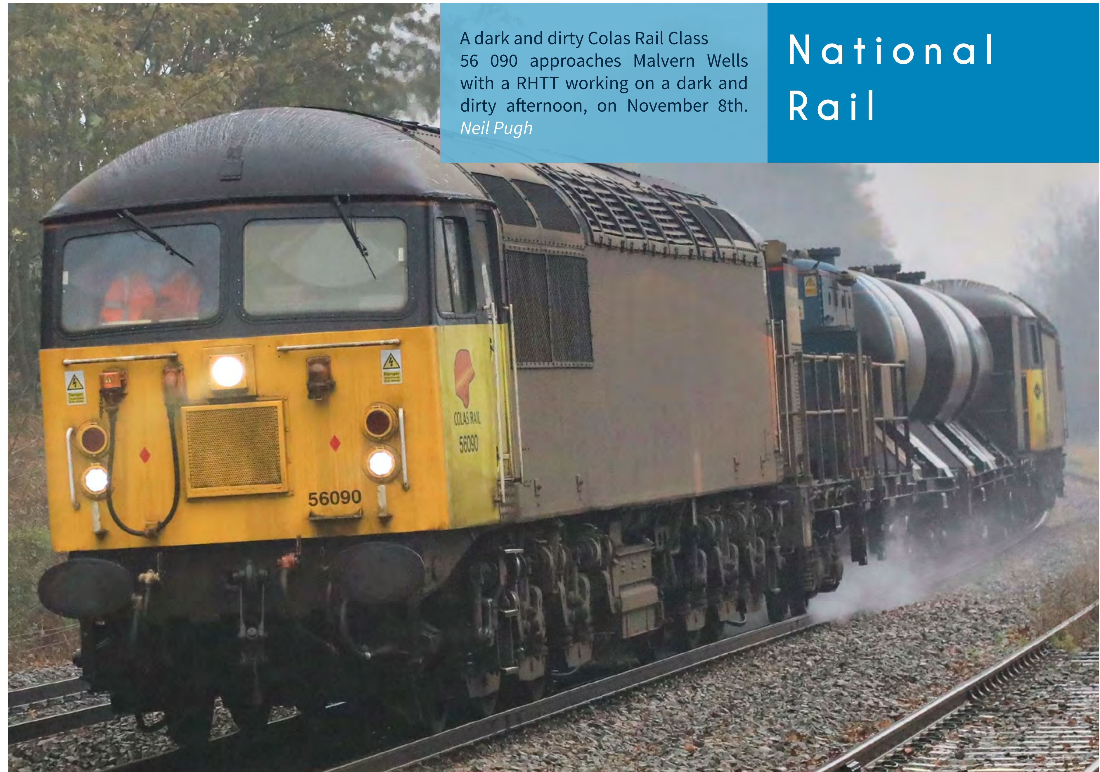
A dark and dirty Colas Rail Class 56 090 approaches Malvern Wells with a RHTT working on a dark and dirty afternoon, on November 8th.

The company has been running a near normal timetable since July, and details of less busy trains are regularly updated on the Greater Anglia website.