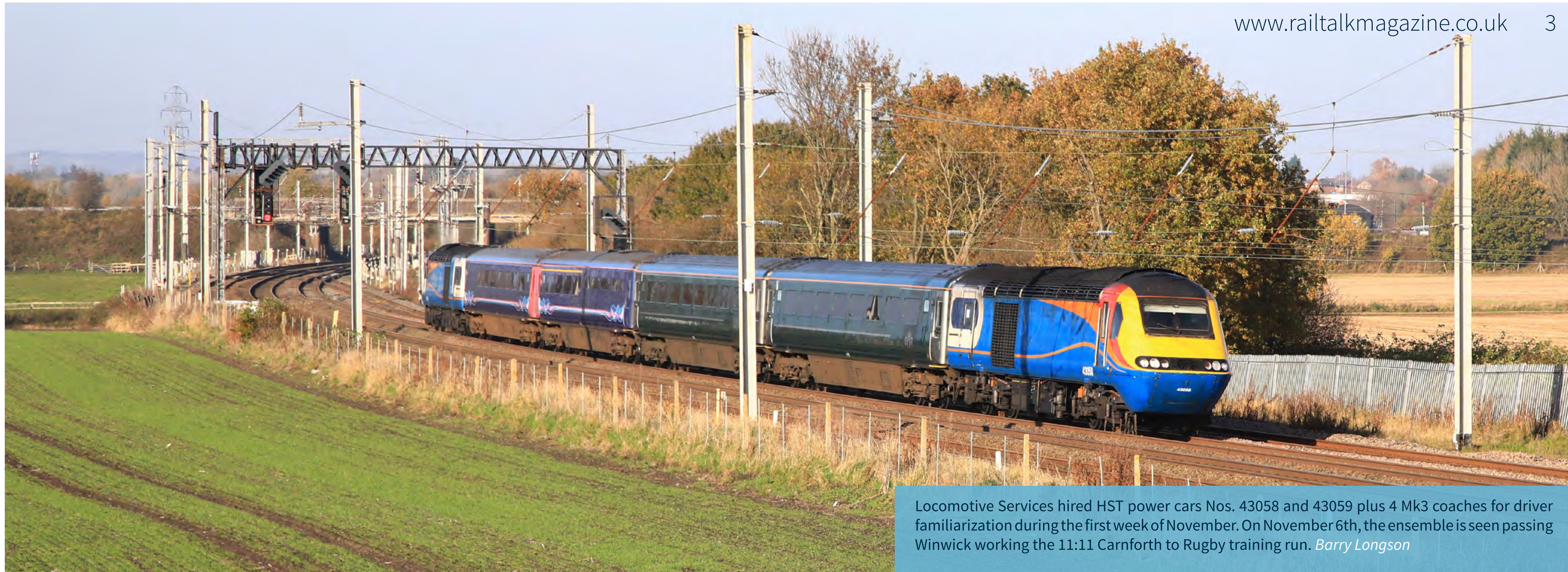
Locomotive Services hired HST power cars Nos. 43058 and 43059 plus 4 Mk3 coaches for driver familiarization during the first week of November. On November 6th, the ensemble is seen passing Winwick working the 11:11 Carnforth to Rugby training run. Barry Longson