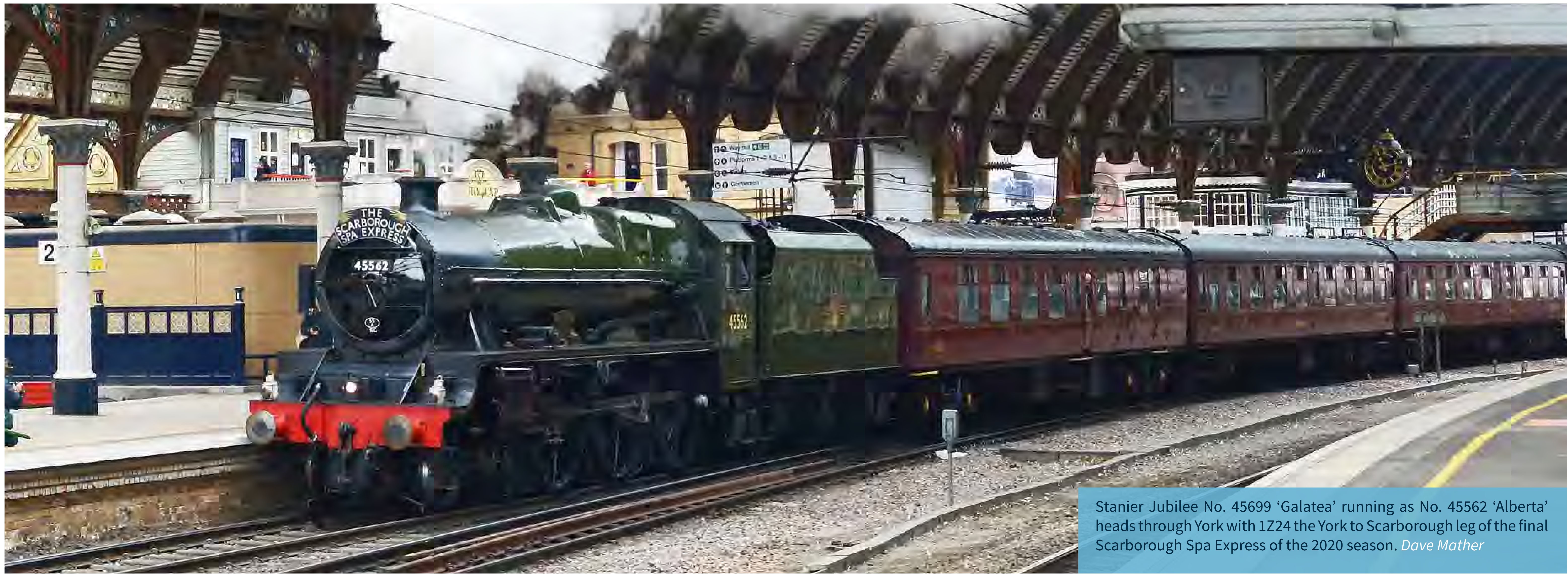
Stanier Jubilee No. 45699 'Galatea' running as No. 45562 'Alberta' heads through York with 1Z24 the York to Scarborough leg of the final Scarborough Spa Express of the 2020 season.