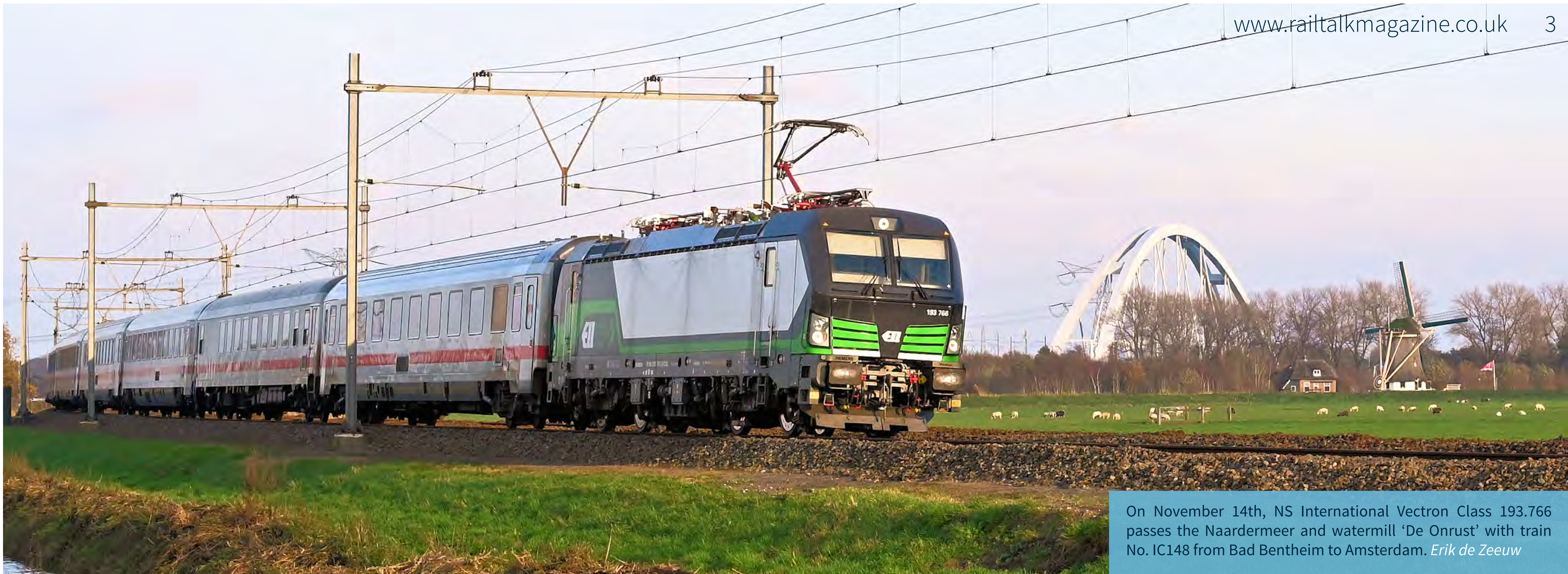
On November 14th, NS International Vectron Class 193.766 passes the Naardermeer and watermill 'De Onrust' with train No. IC148 from Bad Bentheim to Amsterdam.