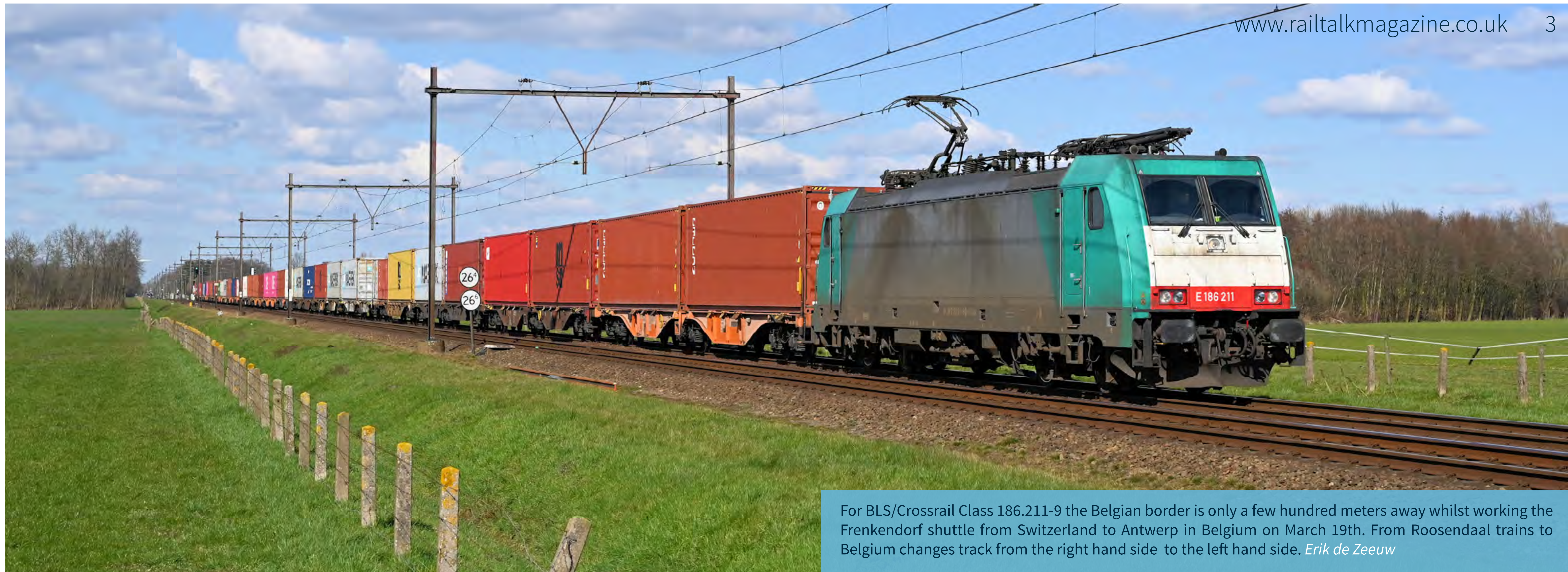
For BLS/Crossrail Class 186.211-9 the Belgian border is only a few hundred meters away whilst working the Frenkendorf shuttle from Switzerland to Antwerp in Belgium on March 19th. From Roosendaal trains to Belgium changes track from the right hand side to the left hand side.