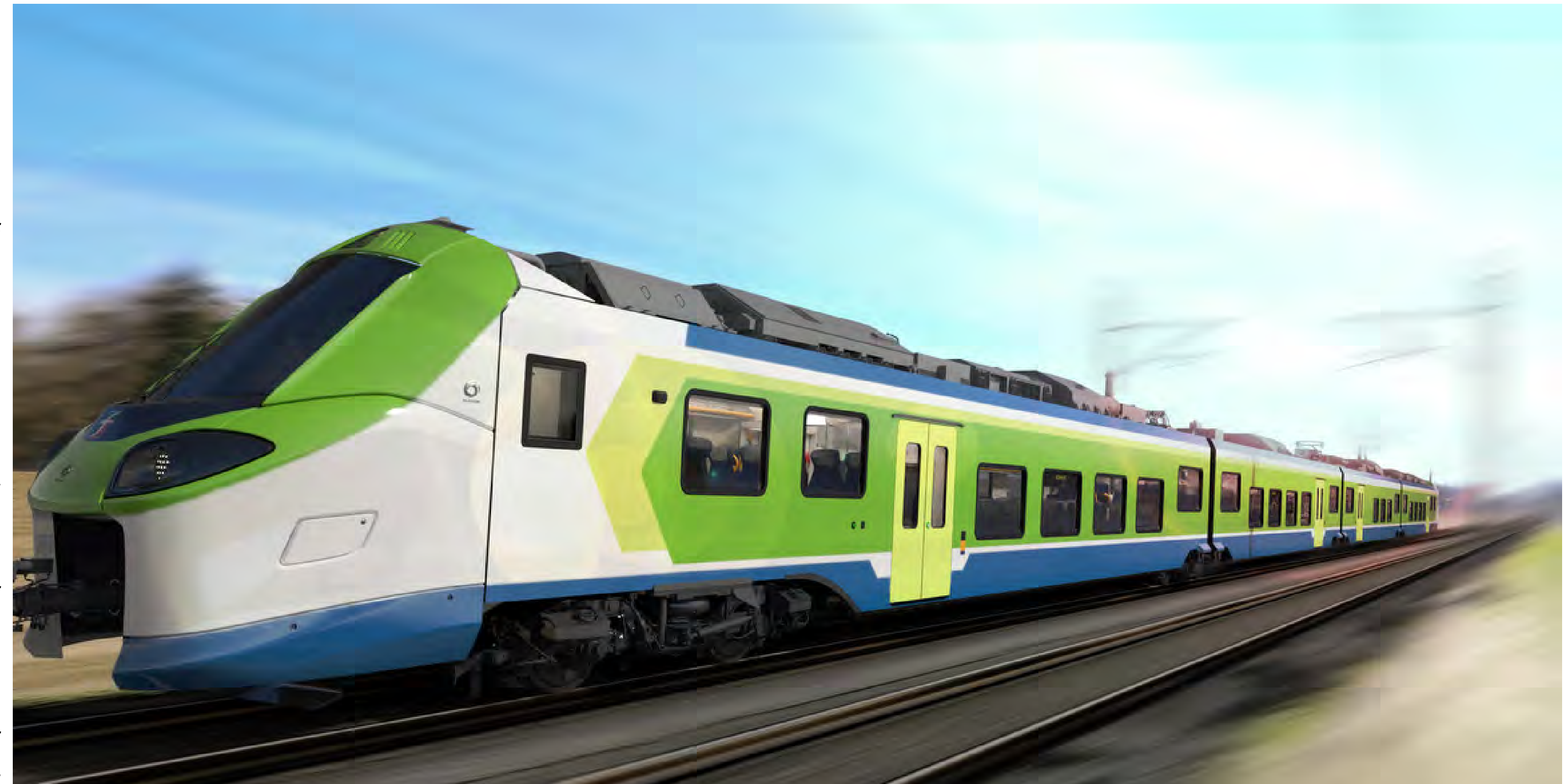
Photo: Coradia Stream regional train for the Region of Lombardy in Italy.

[2] FNM is the main integrated Group in sustainable mobility in Lombardy. It represents the first pole in Italy that combines the management of railway infrastructures with road mobility and the management of freeway infrastructures.