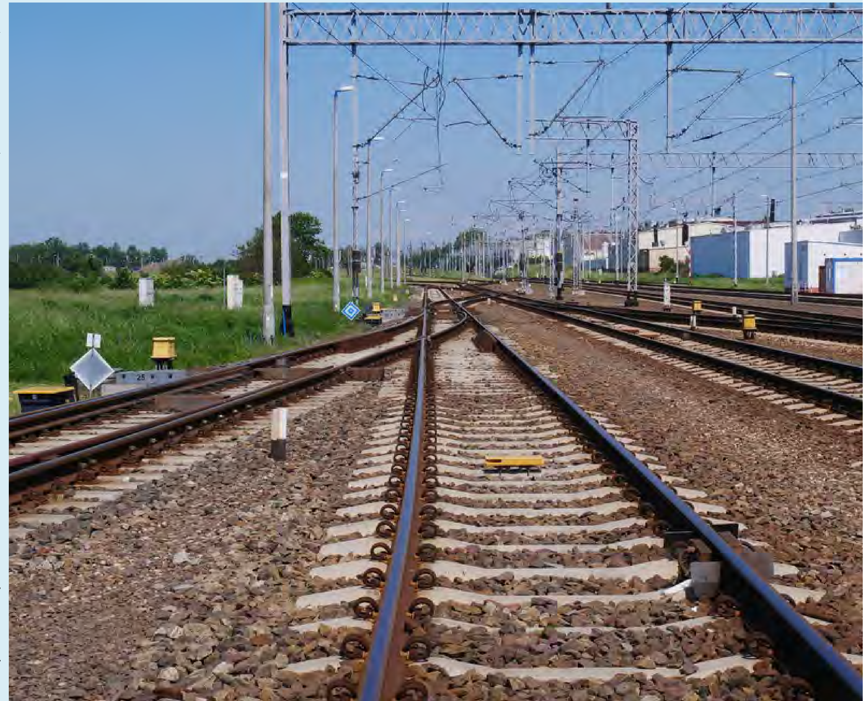
Photo: Signalling solution ERTMS/ETCS Level 2 for the E65 railway line. © Alstom

The task was delivered within the scope of the Operational Programme Infrastructure and Environment (POIiŚ) project 7.1-1.4 "Modernization of E 65/C-E 65 railway line on Warszawa – Gdynia section in terms of supervisory layer LCS (ICR), ERTMS/ETCS/GSM-R, DSAT and power supply for the traction system."