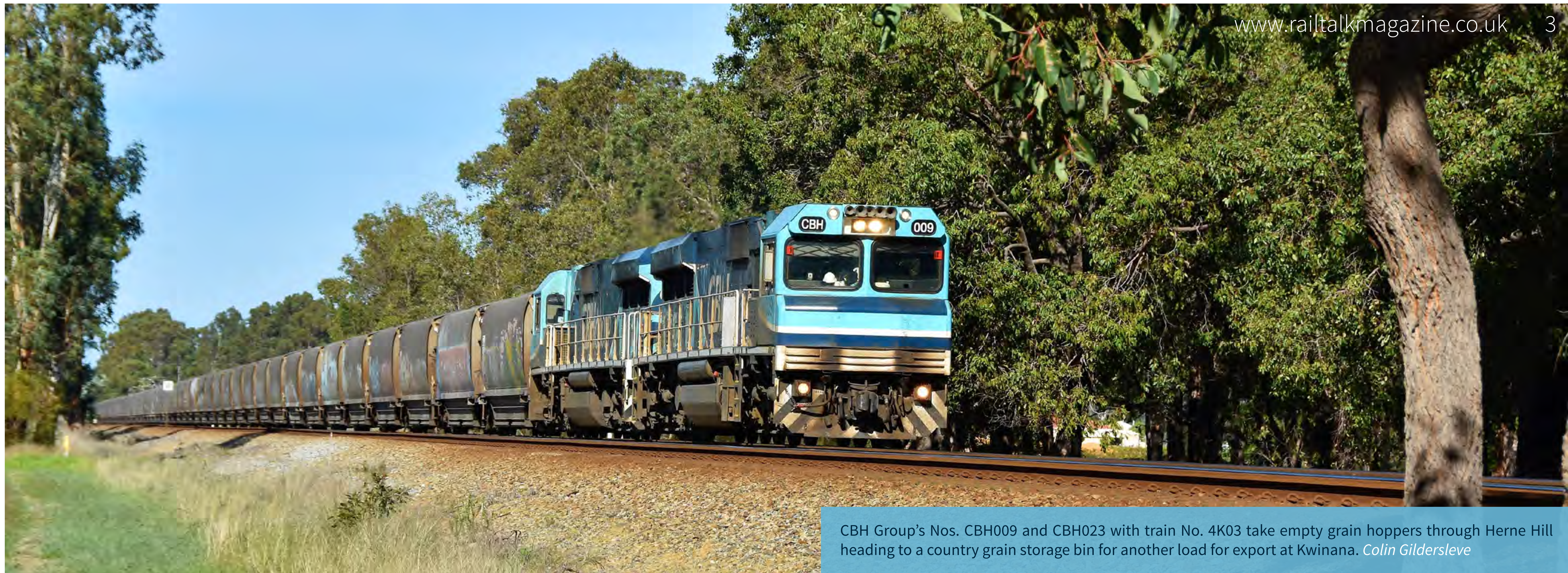
CBH Group's Nos. CBH009 and CBH023 with train No. 4K03 take empty grain hoppers through Herne Hill heading to a country grain storage bin for another load for export at Kwinana. Colin Gildersleve