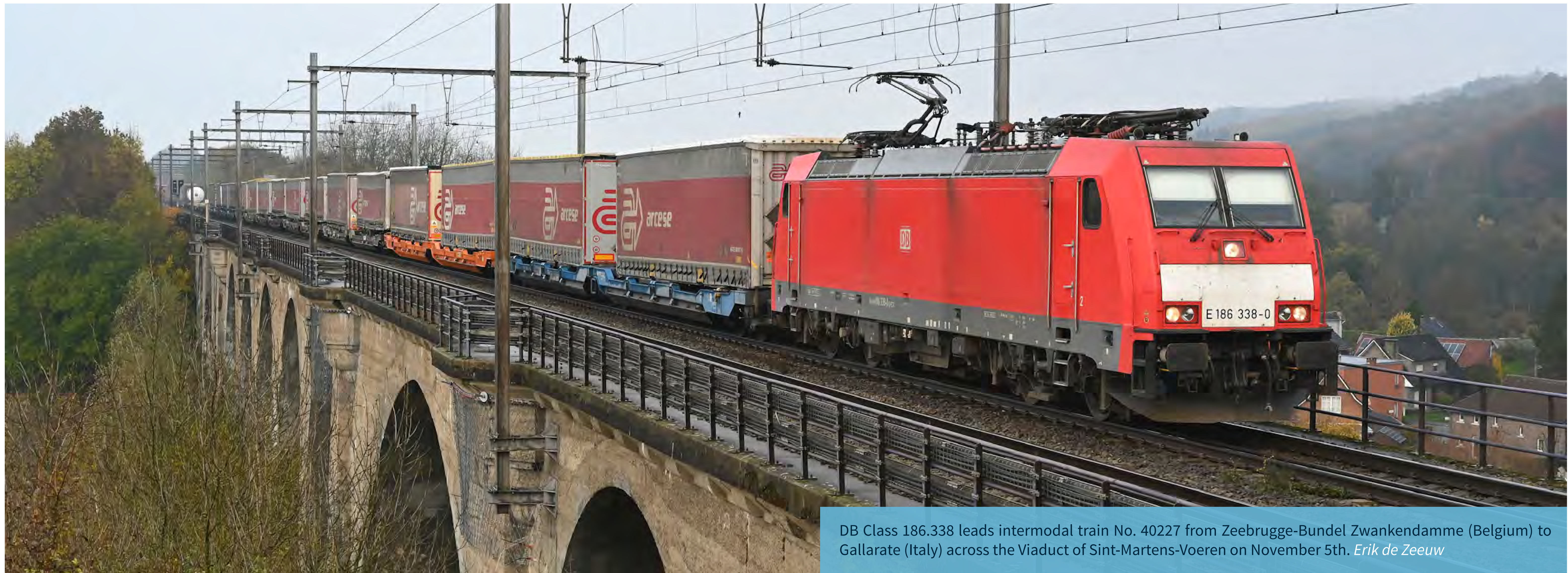
DB Class 186.338 leads intermodal train No. 40227 from Zeebrugge-Bundel Zwankendamme (Belgium) to Gallarate (Italy) across the Viaduct of Sint-Martens-Voeren on November 5th. Erik de Zeeuw