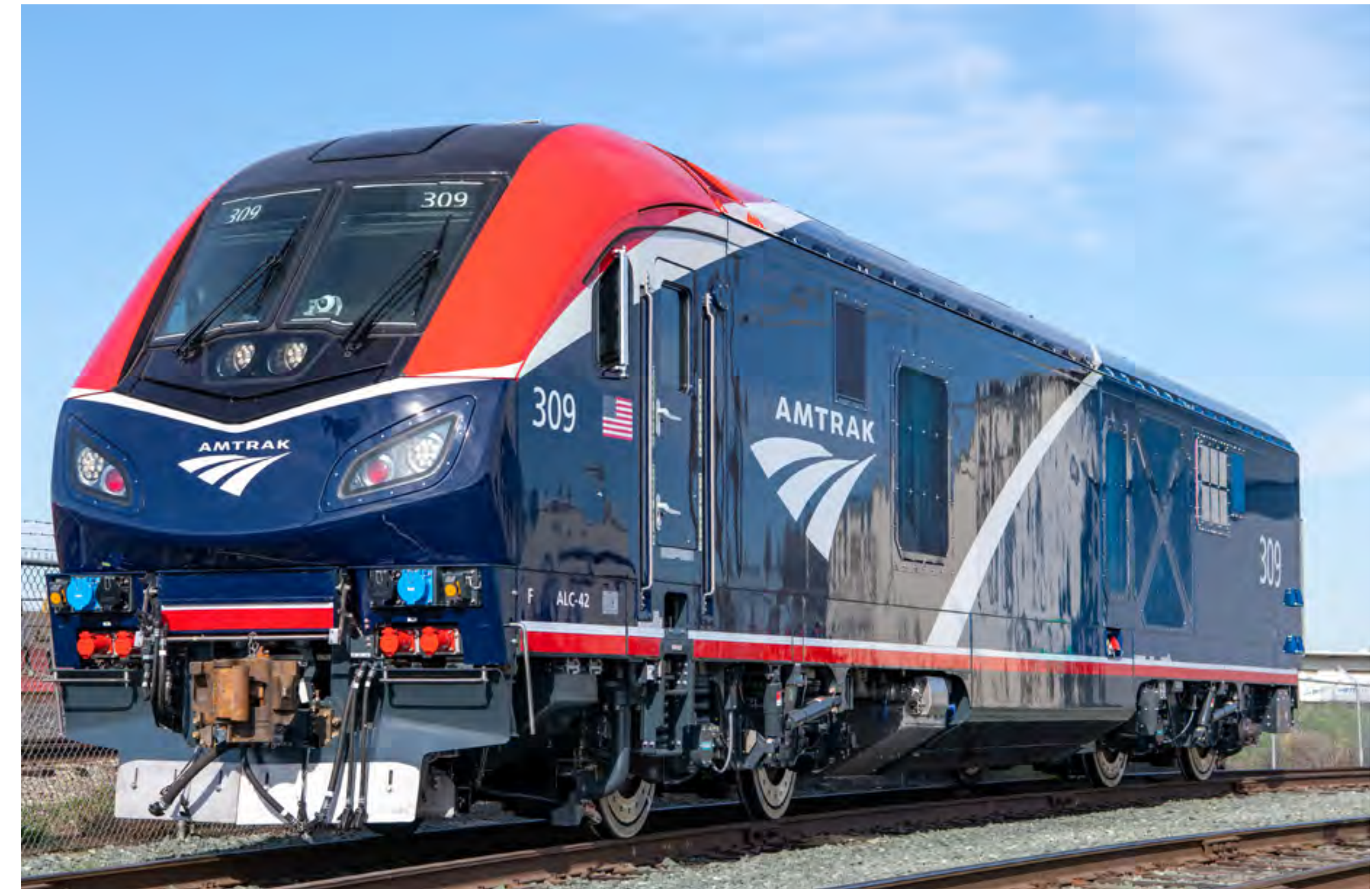
which manufactures the Tier-4 complaint diesel engines in Seymour, Indiana.

It is part of Siemens Mobility's larger U.S. manufacturing network, with eight facilities, more than 4,000 employees and 2,000 American suppliers, including Cummins,