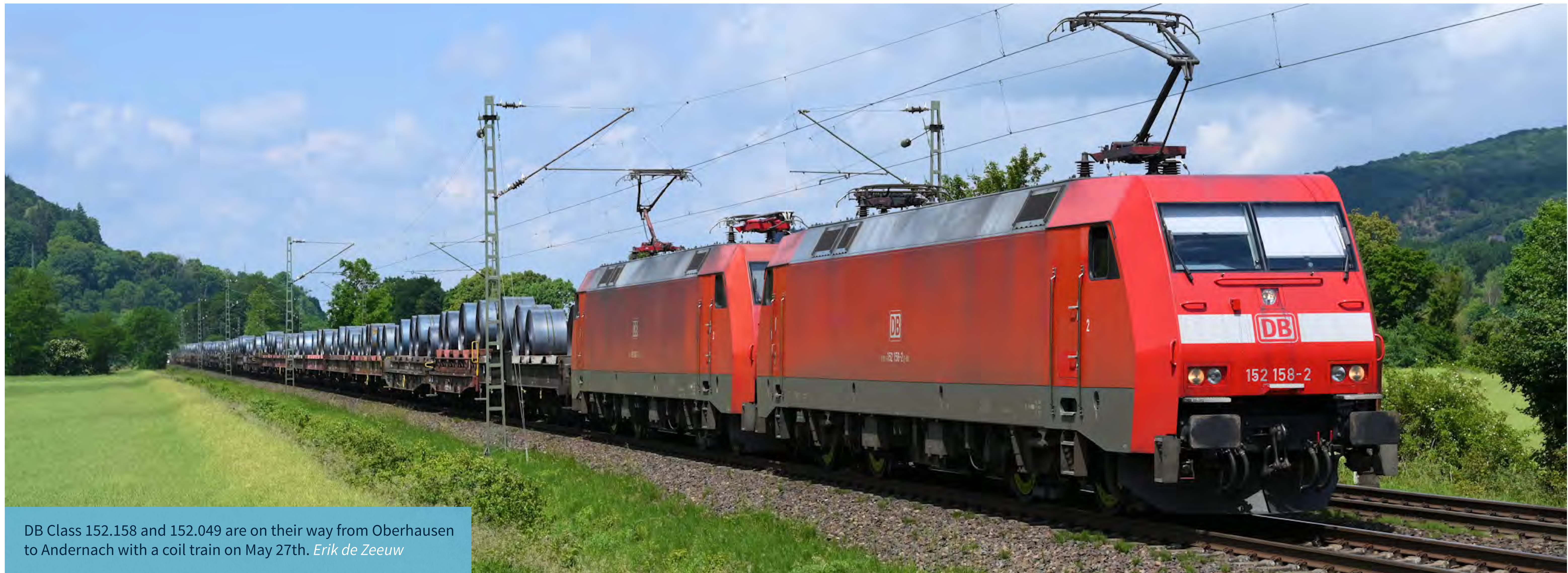
DB Class 152.158 and 152.049 are on their way from Oberhausen to Andernach with a coil train on May 27th.