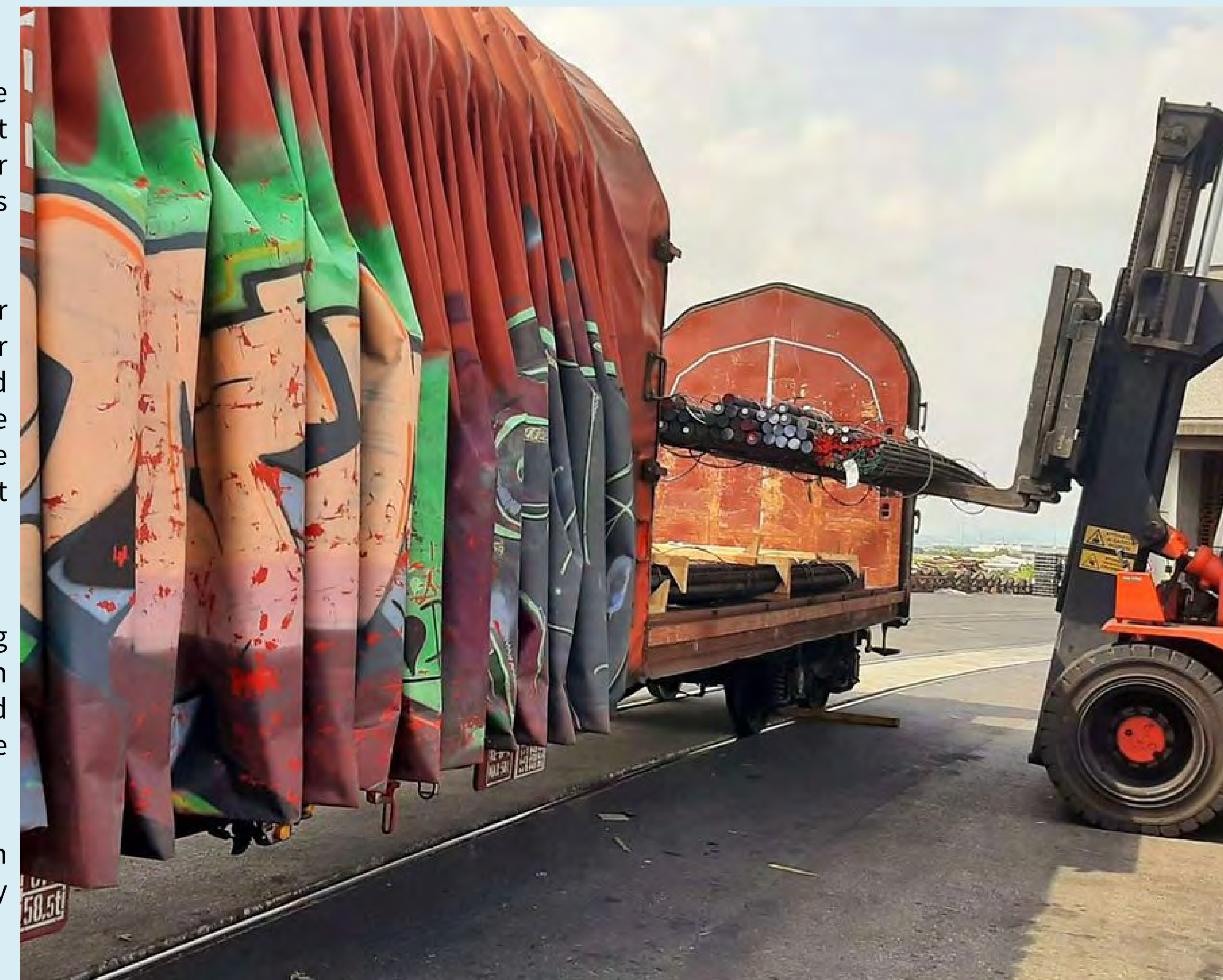
Photo: Steel transport is an important sector of the Italian transport market, but other goods are also transported by rail in Italy.

Sarah Erian is positive about the future: “We're planning more projects like the one in Lesegno, so continued growth in our transport activities in Italy traffic won't be restricted to steel; there may also be new arrival and departure points or even new rail links,” she says.