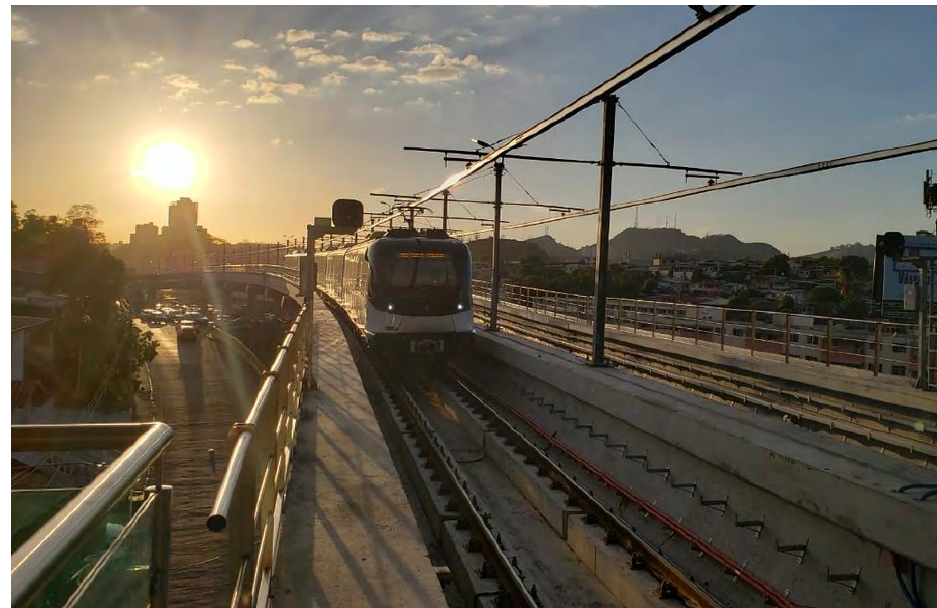
Photo: Currently, Line 1 of the Panama Metro is moving an average of 230,000 users per day, which will be expanded after the completion of the new extension.

The extension of Line 1 to Villa Zaíta aims to establish a terminal station at the northern end of Line 1 with a capacity of more than 10,000 passengers during peak hours and to build a bus interchange with the capacity to serve more than 8,000 passengers during peak hours. and a car park.