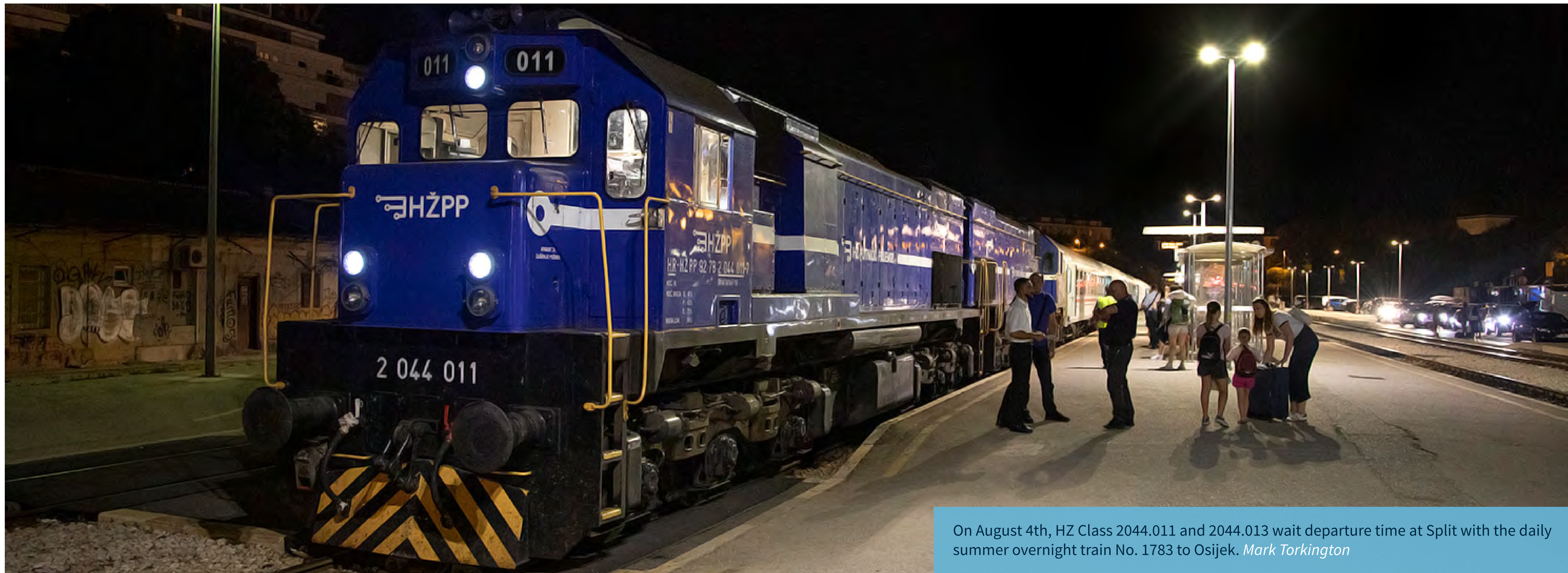
On August 4th, HZ Class 2044.011 and 2044.013 wait departure time at Split with the daily summer overnight train No. 1783 to Osijek.