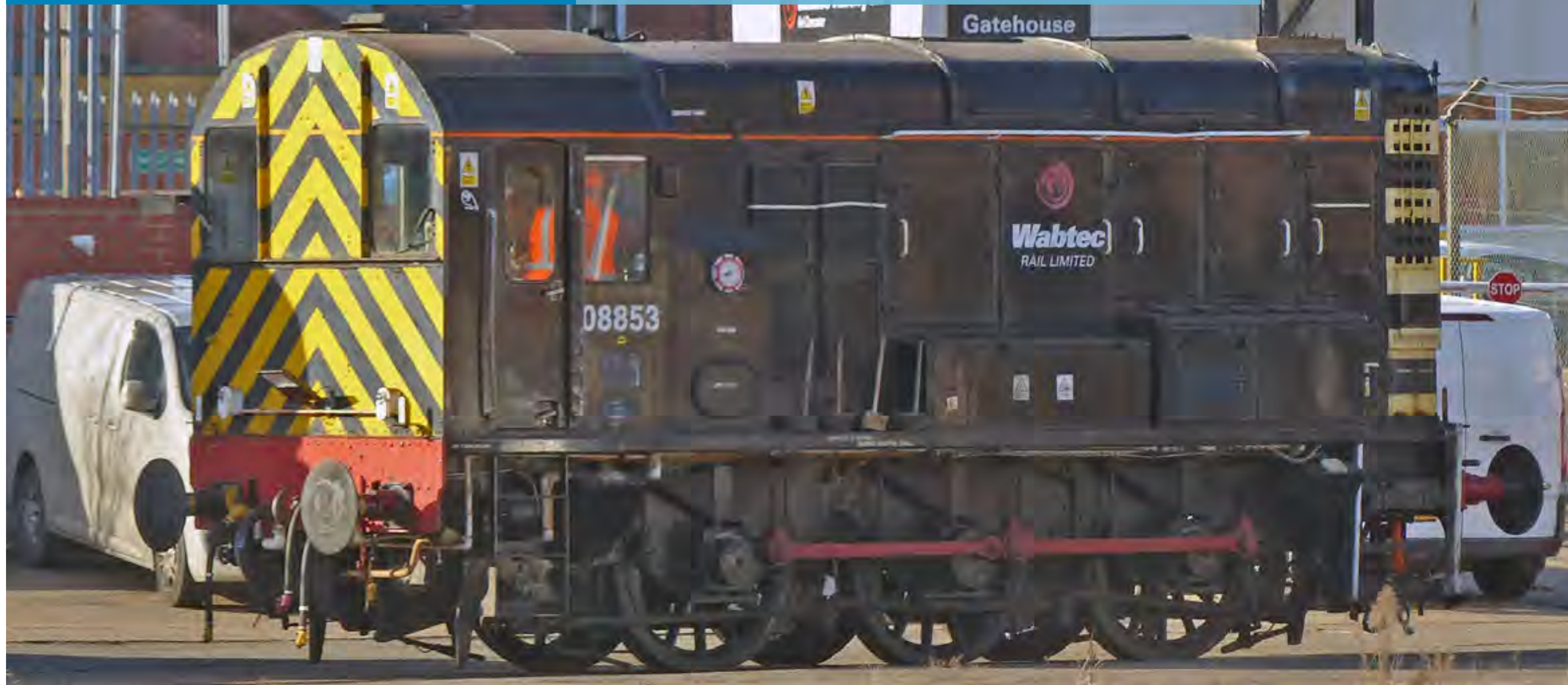
Wabtec's Class 08 853 is seen in operation at Doncaster on February 9th.