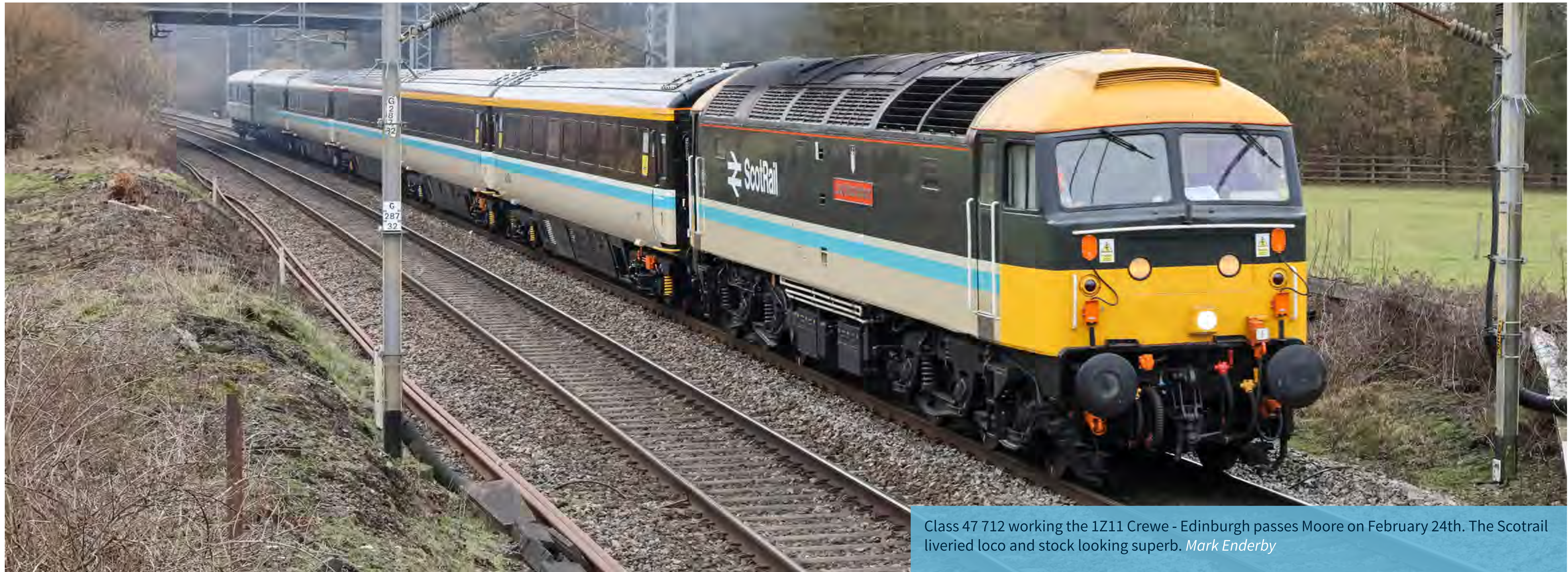
Class 47 712 working the 1Z11 Crewe - Edinburgh passes Moore on February 24th. The Scotrail liveried loco and stock looking superb. Mark Enderby