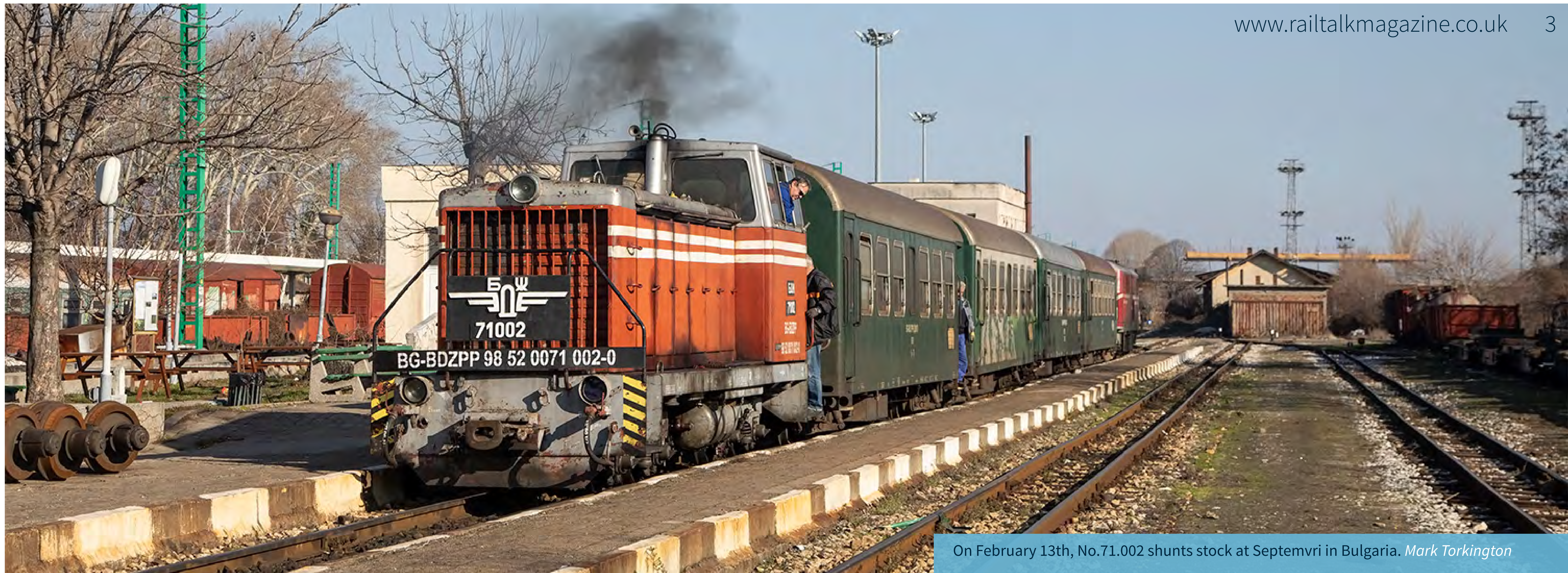
On February 13th, No.71.002 shunts stock at Septemvri in Bulgaria.