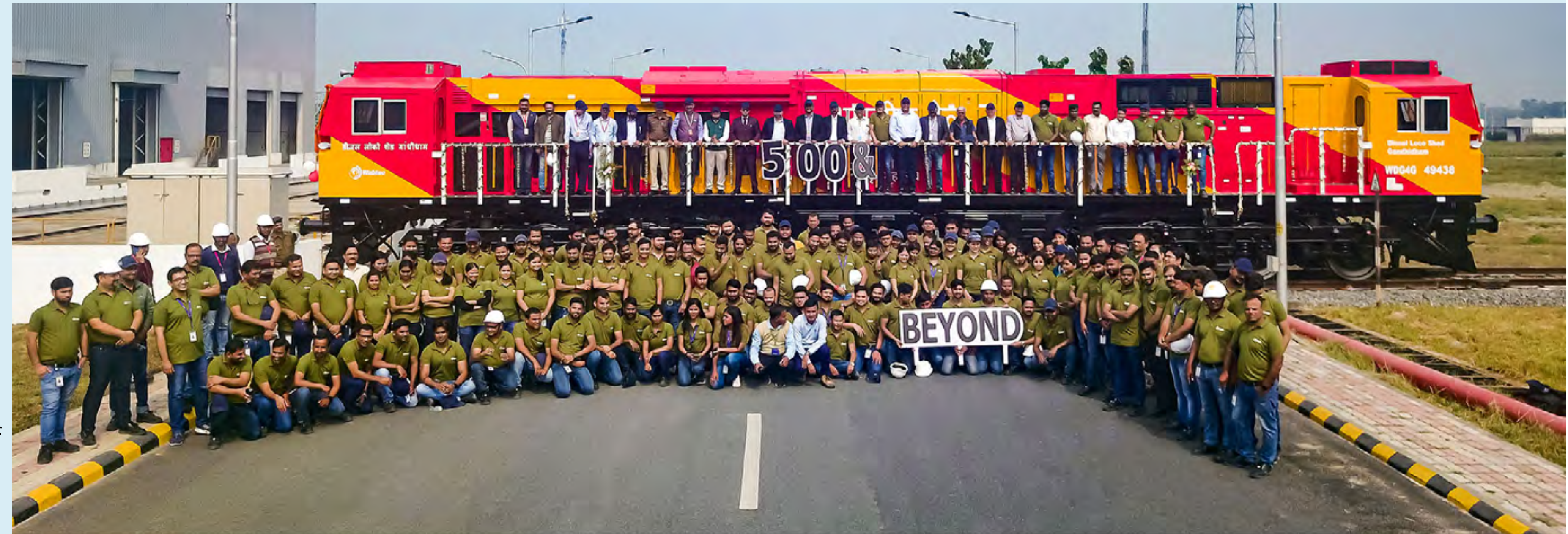
The Wabtec India Team with Indian Railways and Saran District Administration at the factory in Marhowra, Bihar.