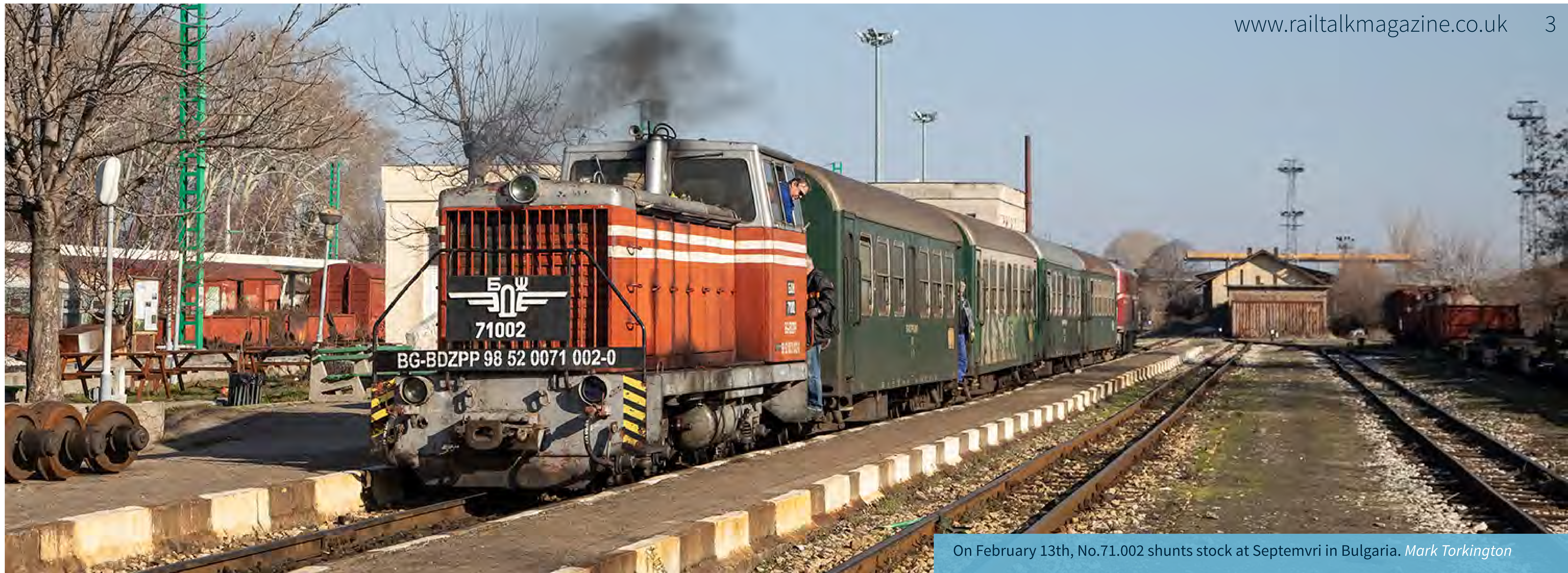
On February 13th, No.71.002 shunts stock at Septemvri in Bulgaria.