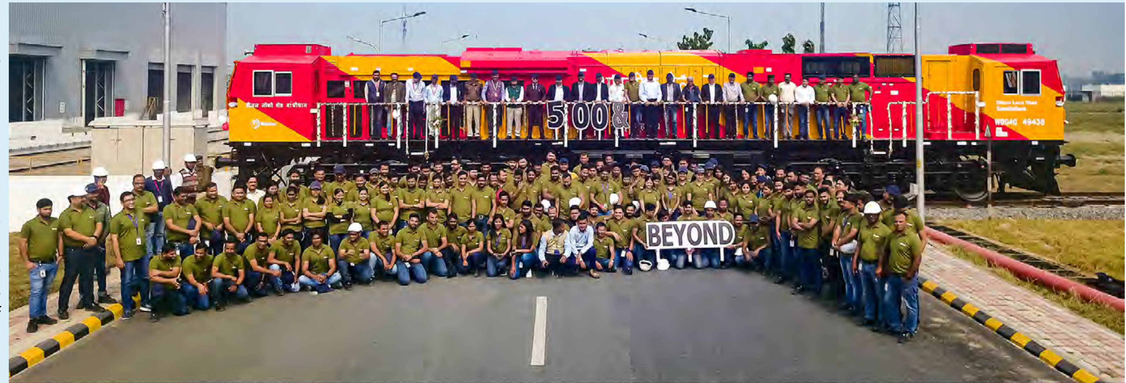
The Wabtec India Team with Indian Railways and Saran District Administration at the factory in Marhowra, Bihar.