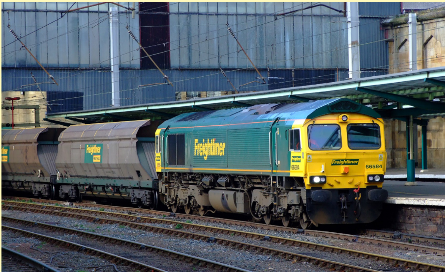
Above: Class 66 584 is seen coming into Carlisle station working the 09.37 6M32 Greenburn - Ratcliffe Power Station Freightliner Heavy Haul train. Jonathan McGurk