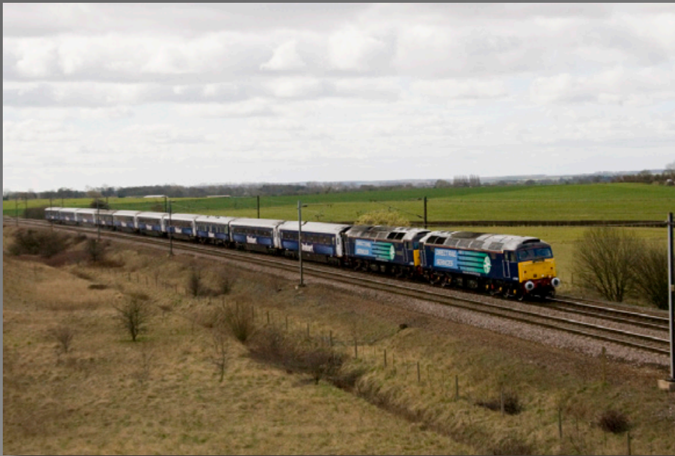
"The Easter West Highlander", run by Stobart Pullman.