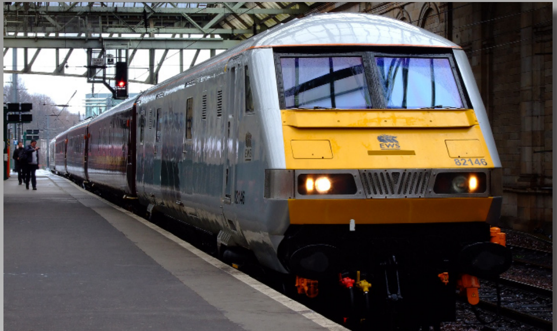
Right: DVT 82146 and Class 67 029 at the rear brought up an EWS company train from Doncaster to Haymarket for the rugby match between Scotland and England. The DVT is seen at Edinburgh Waverley station working 10.46 1205 Doncaster - Haymarket on the 8th March.