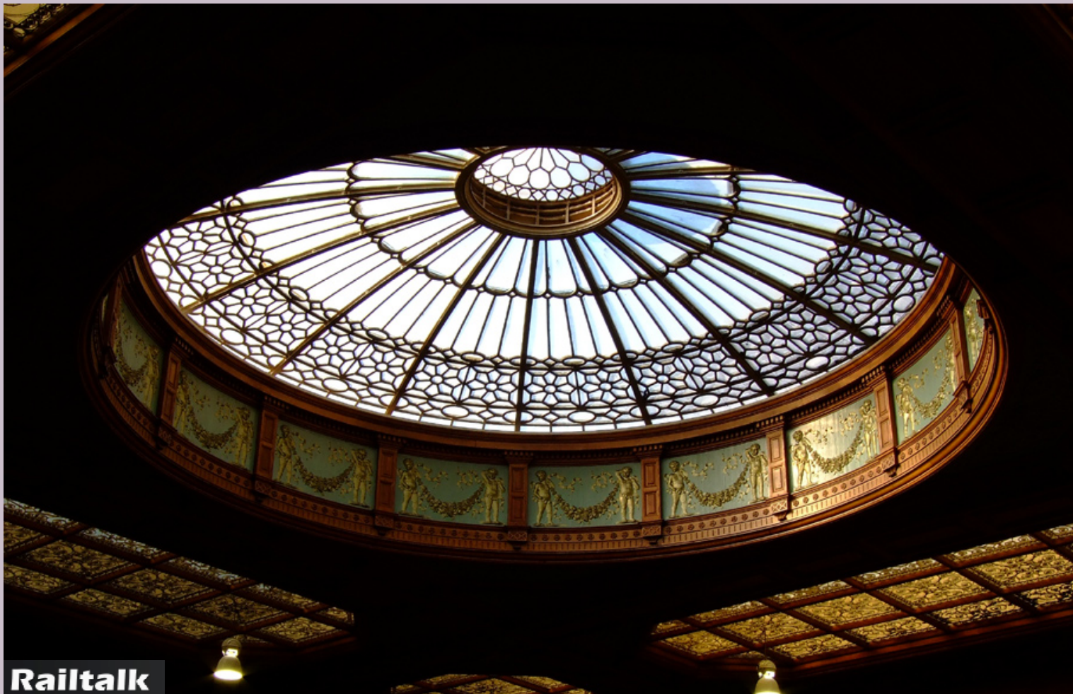
Below: The splendour of Edinburgh Waverley's station retail area. In the area below you have shops, station waiting area and ticket office. Jonathan McGurk