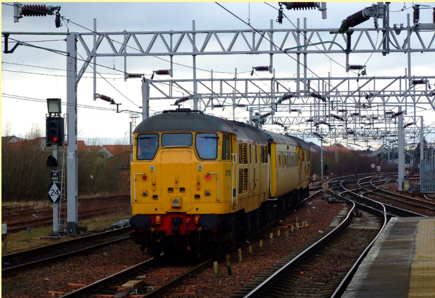
Above: Class 31 602 and Class 31 105 are seen passing through Motherwell heading north while working the 09.09 1Q52 Mossend Down Yard - Mossend Down Yard via Hamilton, Newton, Kings Park and Lanark Network Rail Track Measurement Train on the 27th March. Below: We said last month that this Class 66 was looking a little tatty, well it still is!. This is 66 522 at Ironbridge on the 12th March.