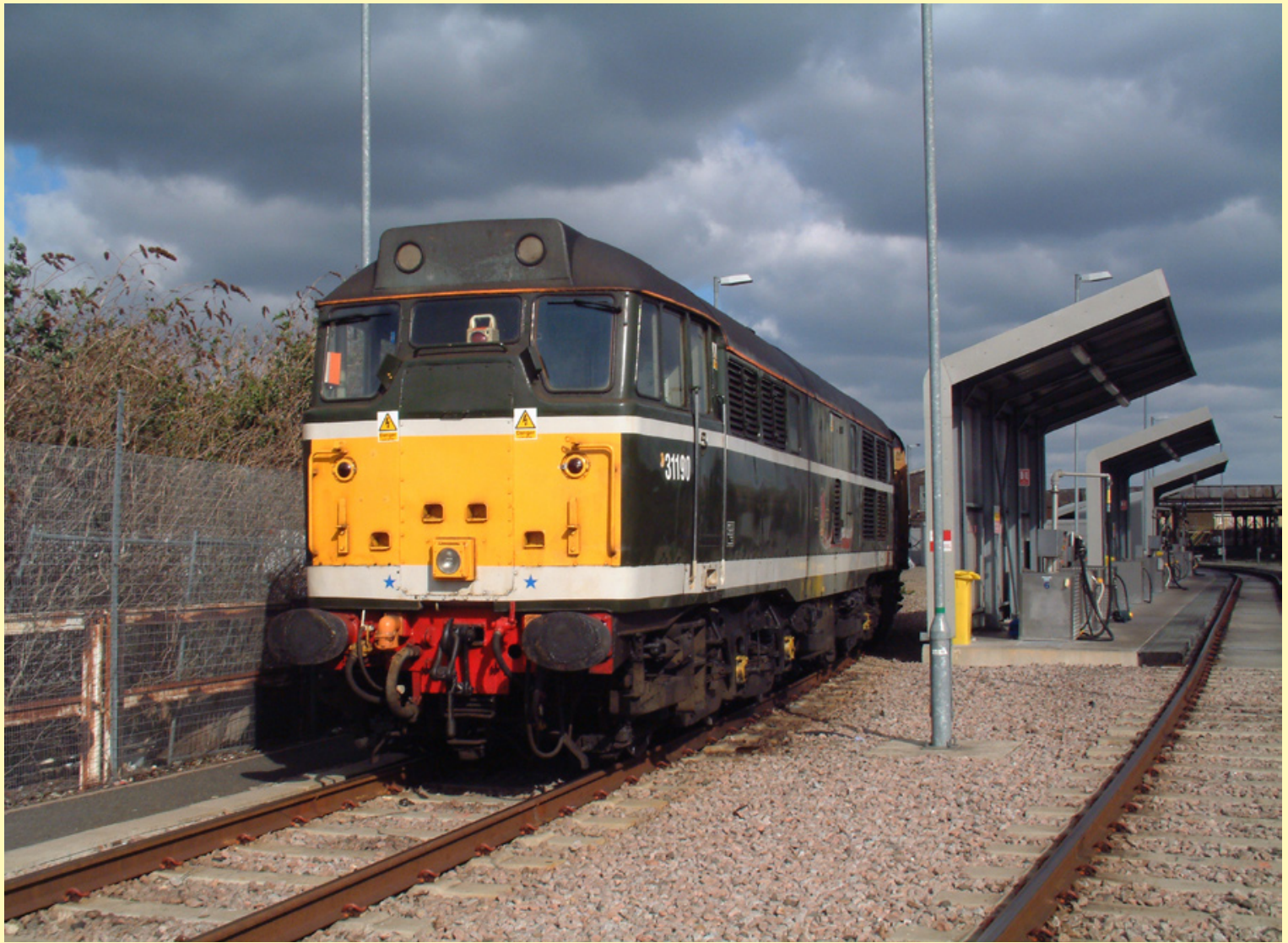
Above: Class 31 190 'Spalding Town', seen stabled at Norwood with a Serco test train, on the 4th March 2008. Below: An almost perfect reflection of this Virgin Super Voyager as it stands in the rain at Crewe, working a service to Holyhead.