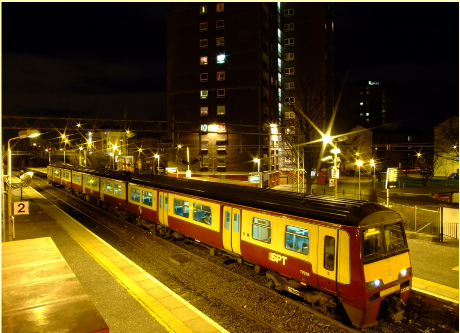
Above: Class 320 318 is seen calling at platform 1 of Dalmuir station working the 19.39 2E55 Springburn - Balloch service on the 17th March. Below: Network Rail has been running some test trains using a single Class 31 and a DBSO in order to remove the need for a second Class 31. Here the Class 31, 31 105 was powering the train from the rear and the DBSO unit was driving the test train north through Winwick Jct on March 7th.