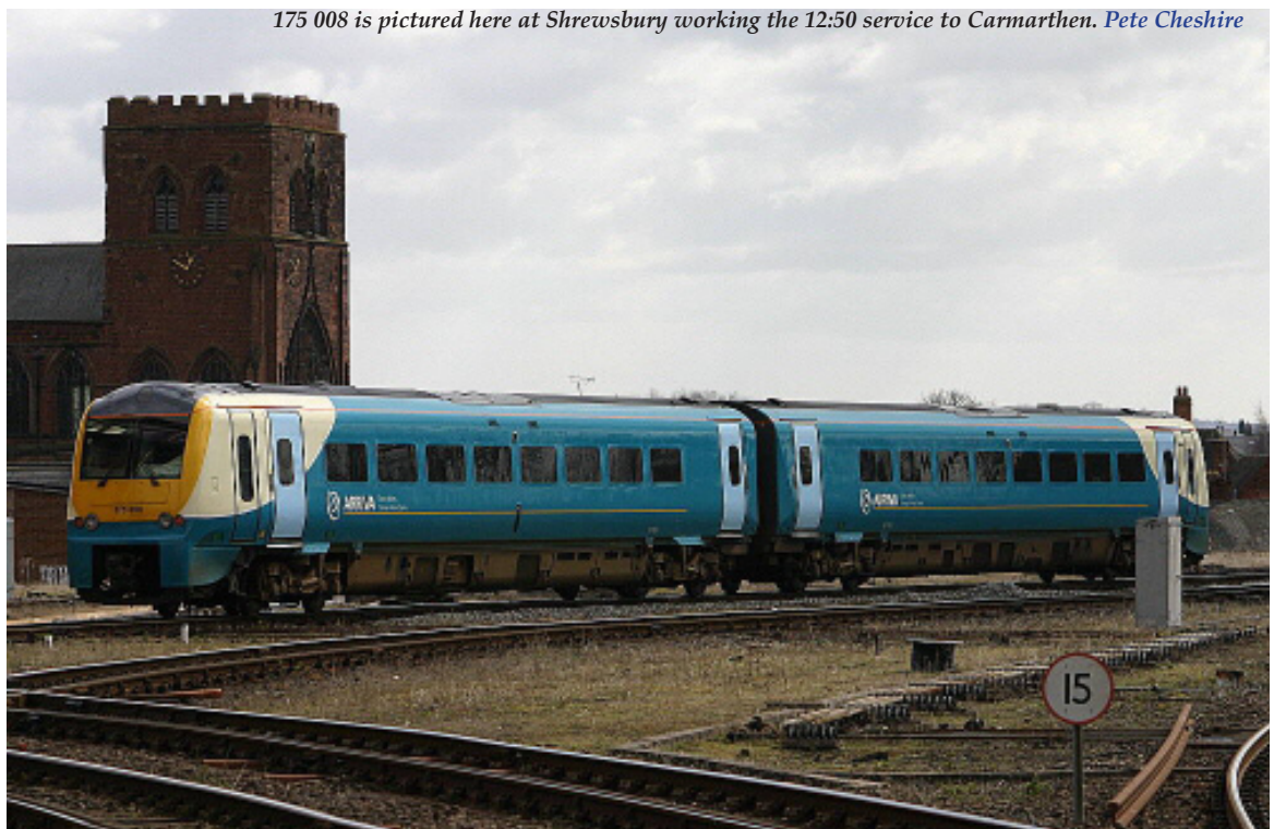
175 008 is pictured here at Shrewsbury working the 12:50 service to Carmarthen.

At Porthmadog the attendees visited the Ffestiniog Railway, one of the participants in the CRP's 'Catch the BIG TRAINS to Meet The Great Little Trains of Wales' promotion, where they enjoyed a buffet lunch in its Spooners Café and Bar, an introduction to the Ffestiniog Railway and a short trip on one of the world famous trains as far as Minfordd from where they caught the regular Cambrian Coast Line service back to Machynlleth.