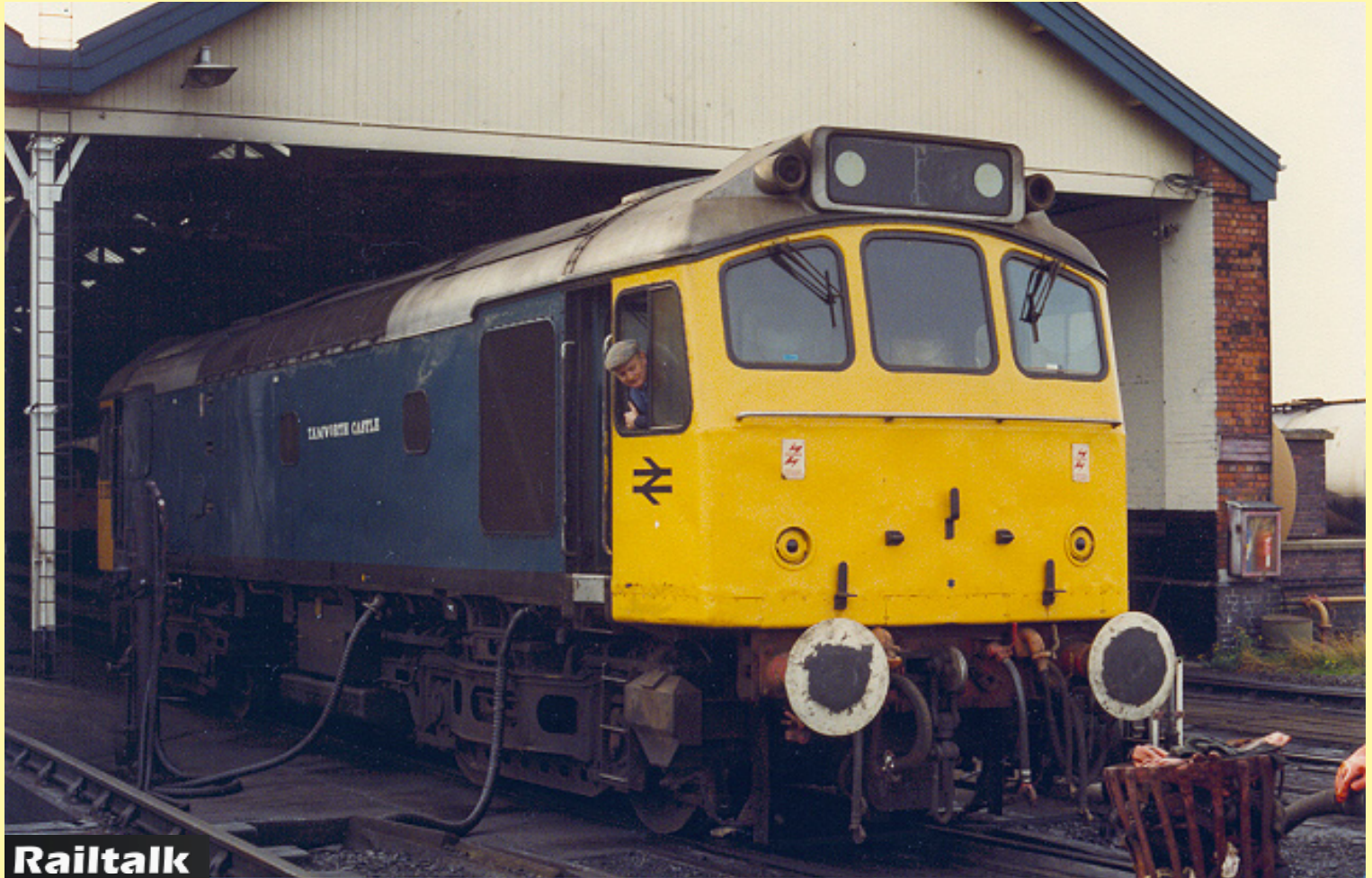
Below: Class 25 322 unofficially named "Tamworth Castle", taking fuel at Llandudno Jct on the 13th October 1983.