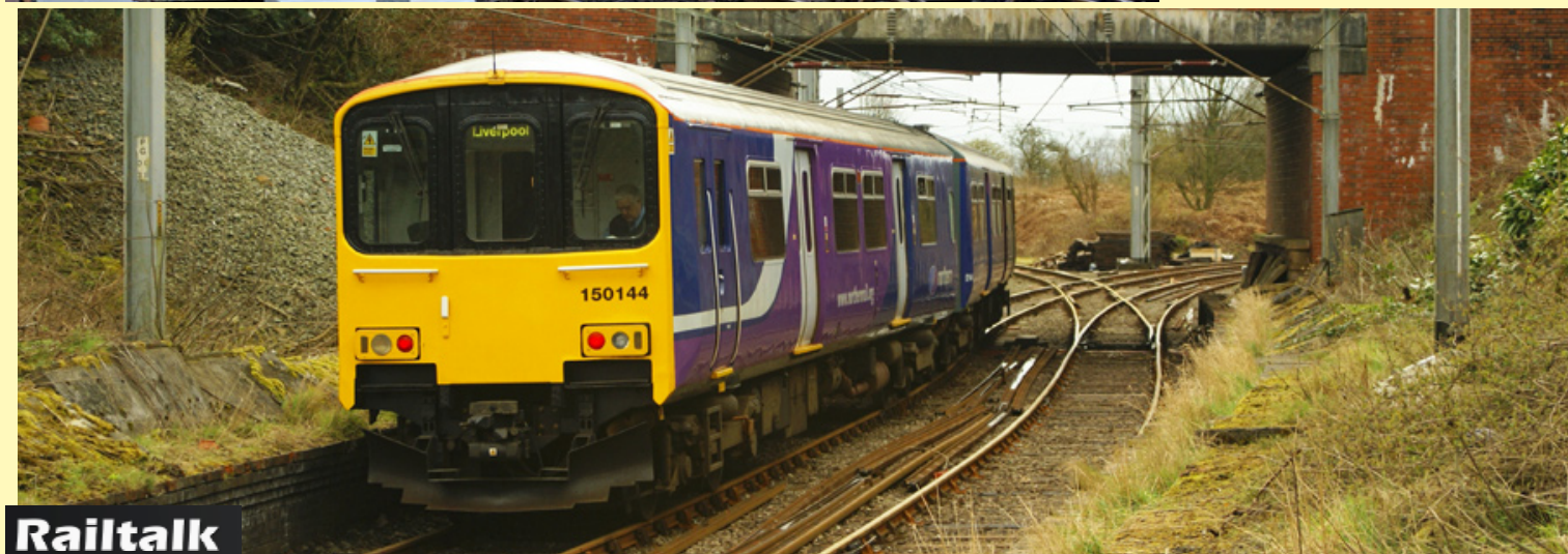
Bottom: Class 150 144 is photographed with the diverted 10.01 Wigan-Liverpool Lime St. Diverted via the freight only line at Lowton Jct on Sunday March 16th. The train is seen stopped at the site of the closed Lowton Jct station with a red light, while the driver uses the telephone. Dave Harris