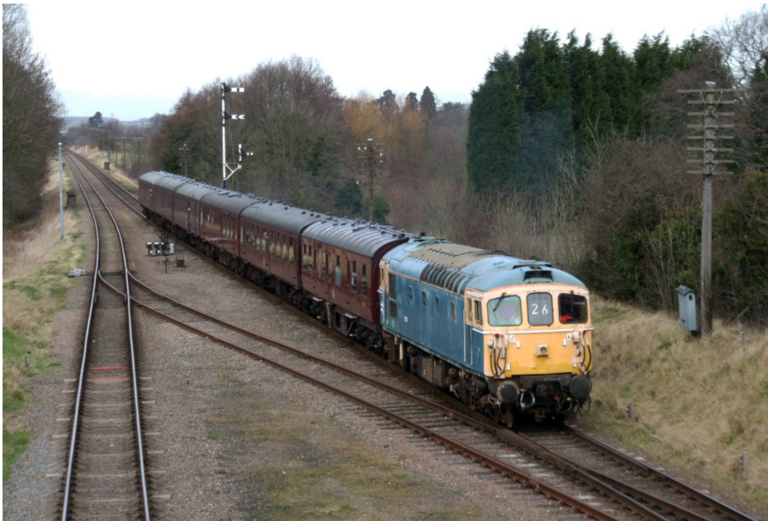
Above: The Great Central also held a Diesel Gala on the 14th March. D6535 is seen approaching Quorn and Woodhouse Station with 2A13 12.30 Loughborough - Leicester North. D6535 was standing in for Class 45 D123, which would not start due to flat batteries. The Class 45 did start up later in the day and carried on with D6535's diagrams and D6535 carried on with D123's Diagrams. Steve Madden Below: D5830 approaching Rothley Station with 2A16 13.15 Loughborough - Leicester North on the 14th March. Steve Madden