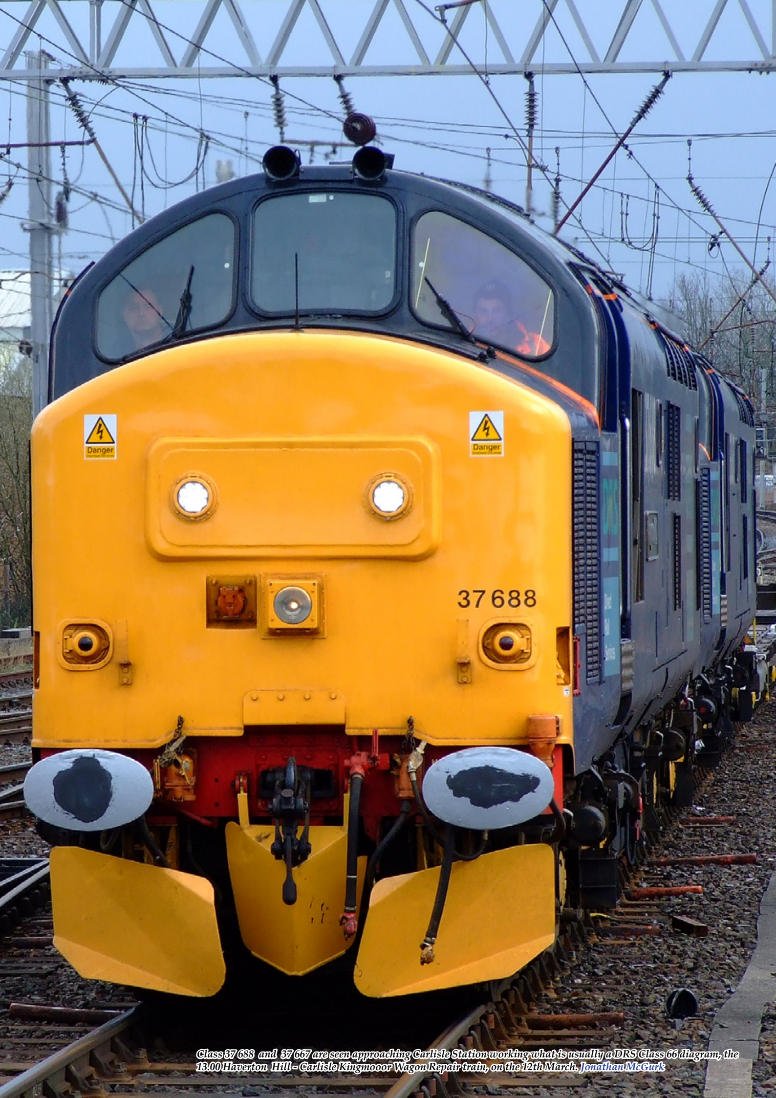
Class 37 688 and 37 667 are seen approaching Carlisle Station working what is usually a DRS Class 66 diagram, the 13.00 Haverton Hill - Carlisle Kingmoor Wagon Repair train, on the 12th March.