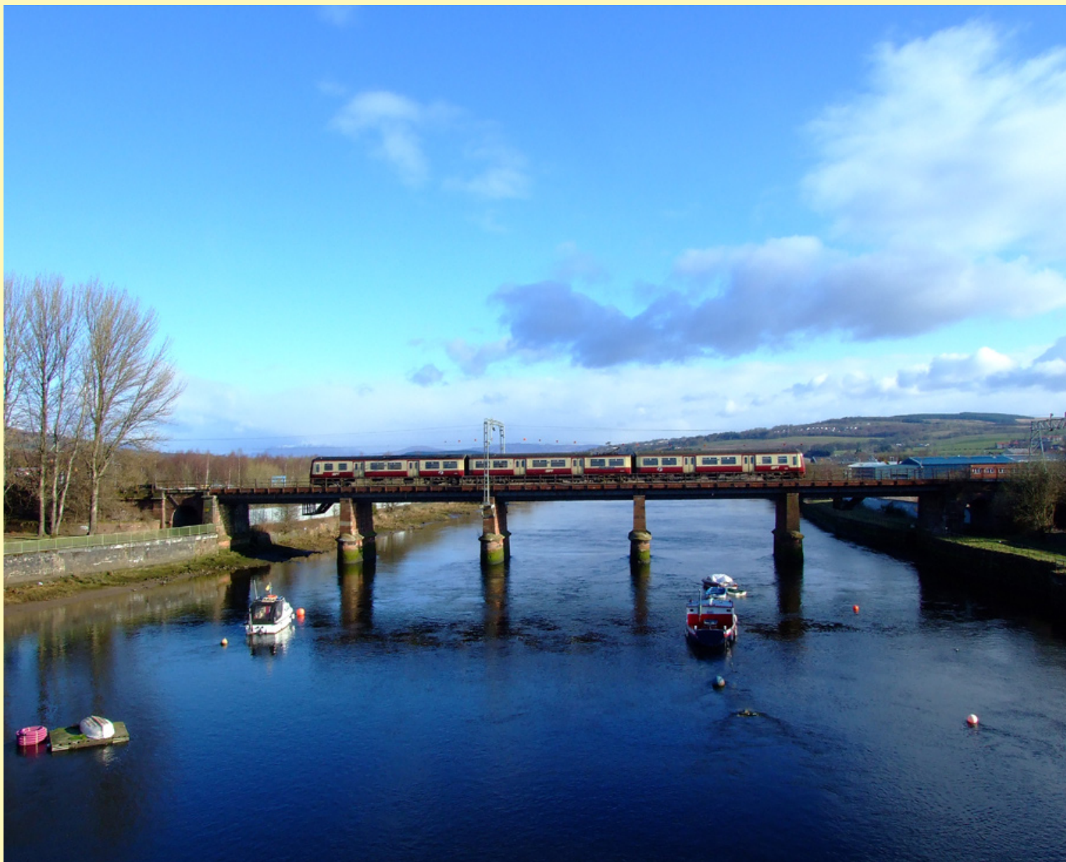
Above: We've had a shot from this location before, and thought we'd have another. Class 320 305 forms the 08.08 2H76 Helensburgh Central - Drungelloch seen crossing the Dalreoch Viaduct on the 24th March.