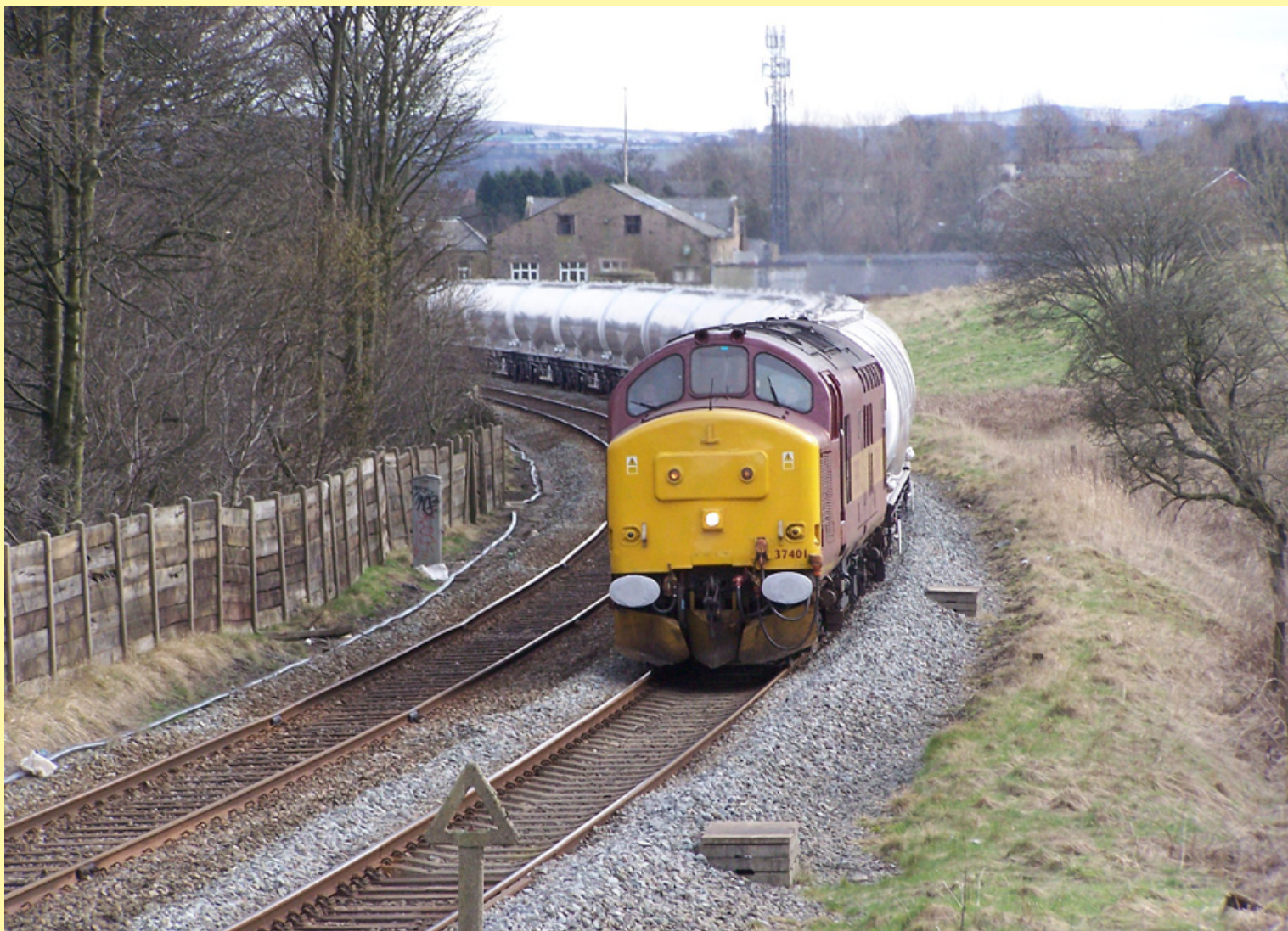
Above: This is Brownhill, near Blackburn, and shows 37 401 on a 6Z50 Warrington-Clitheroe working. It was delivering new wagons to Clitheroe Cement for a new working which is about to start.