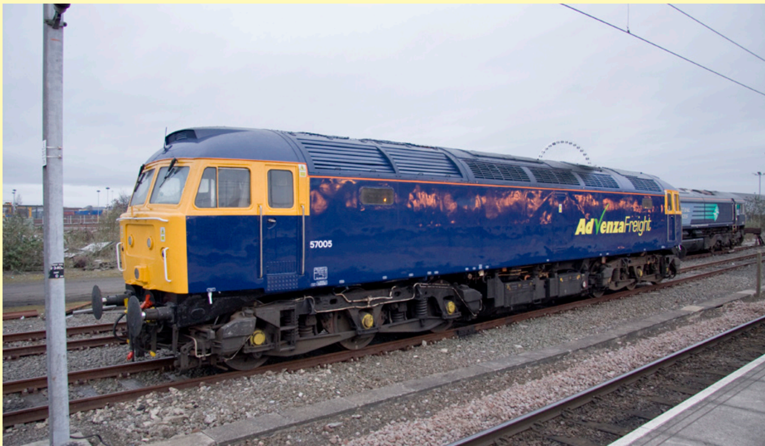
Above: Advenza Freight have started becoming regular visitors to York and the North-East. Class 57 005 is seen in the now regularly used "Parcels Siding", alongside a DRS Class 66. Class47