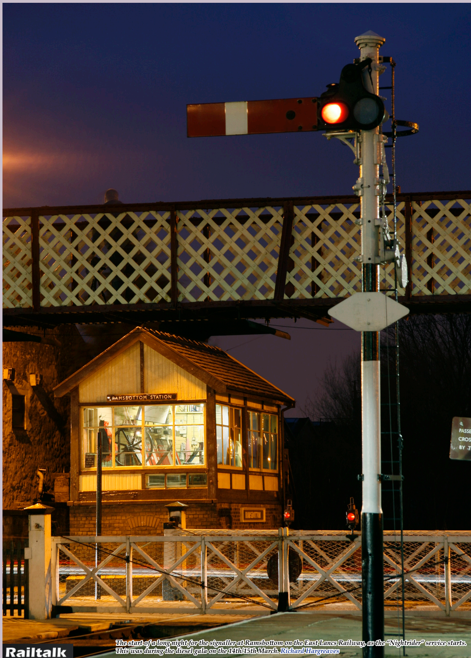
The start of a long night for the signaller at Ramsbottom on the East Lancs Railway, as the "Nightrider" service starts. This was during the diesel gala on the 14th/15th March.