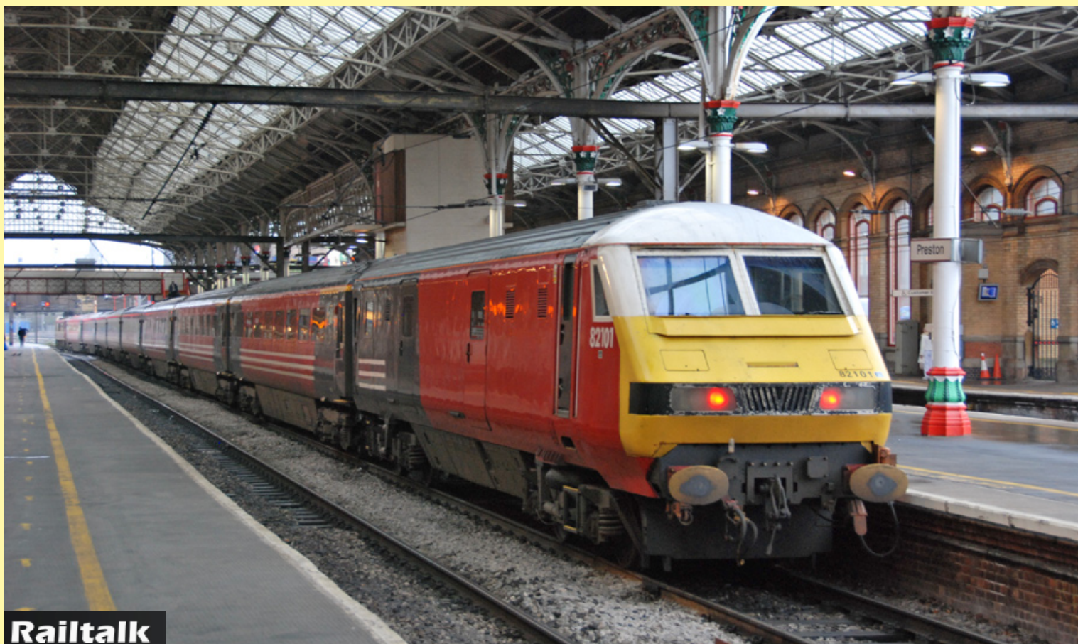
Below: Fridays, sometimes, and special occasions, the Virgin hired-in set gets to travel north of Birmingham. This occasion of a spin up to Preston was for Easter and Class 90 020 and DVT 82101 are seen at Preston on the 20th March. Ian Furness