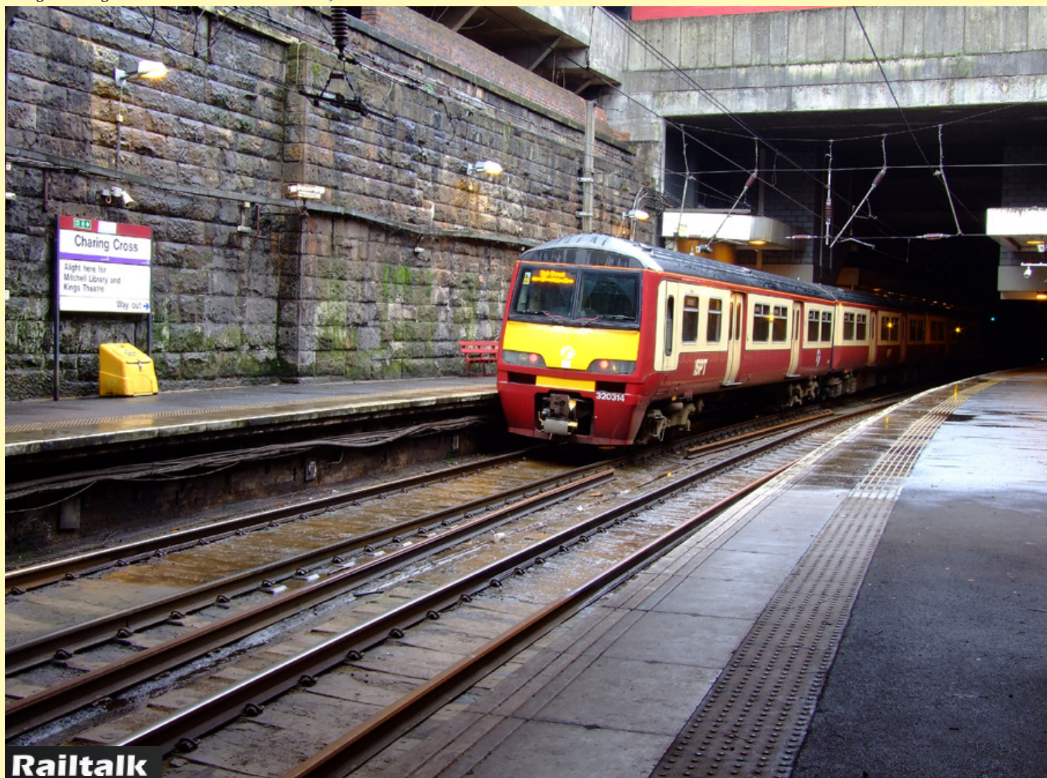
Below: We thought that there was only one Charing Cross. Class 320 314 is seen calling at platform 1 of Charing Cross station working the 14.57 2M26 Milngavie - High Street service on the 1st March. Jonathan McGurk