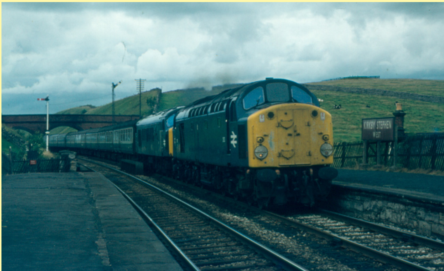
Above: Class 40, 283 and Class 45, D49 double-head the 09.50 Glasgow Central - London St. Pancras - Thames-Clyde Express - through Kirkby Stephen West on 4th August 1973. This train was still an important train and travelled the complete ex-Midland Route. The Class 40 was used to provide additional power for this heavily loaded train, over the steeply graded Settle and Carlisle route, it normally being detached at Leeds City. David Mead