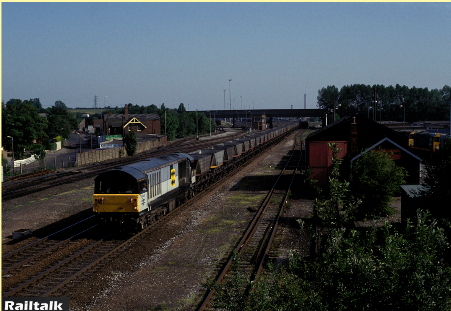
Below: Class 58 046 is seen working through Toton on a glorious 26th May 1992. Once the mainstay of MGR operations in the Midlands, members of this class are now either on hire in Europe or stored at various locations in the UK.