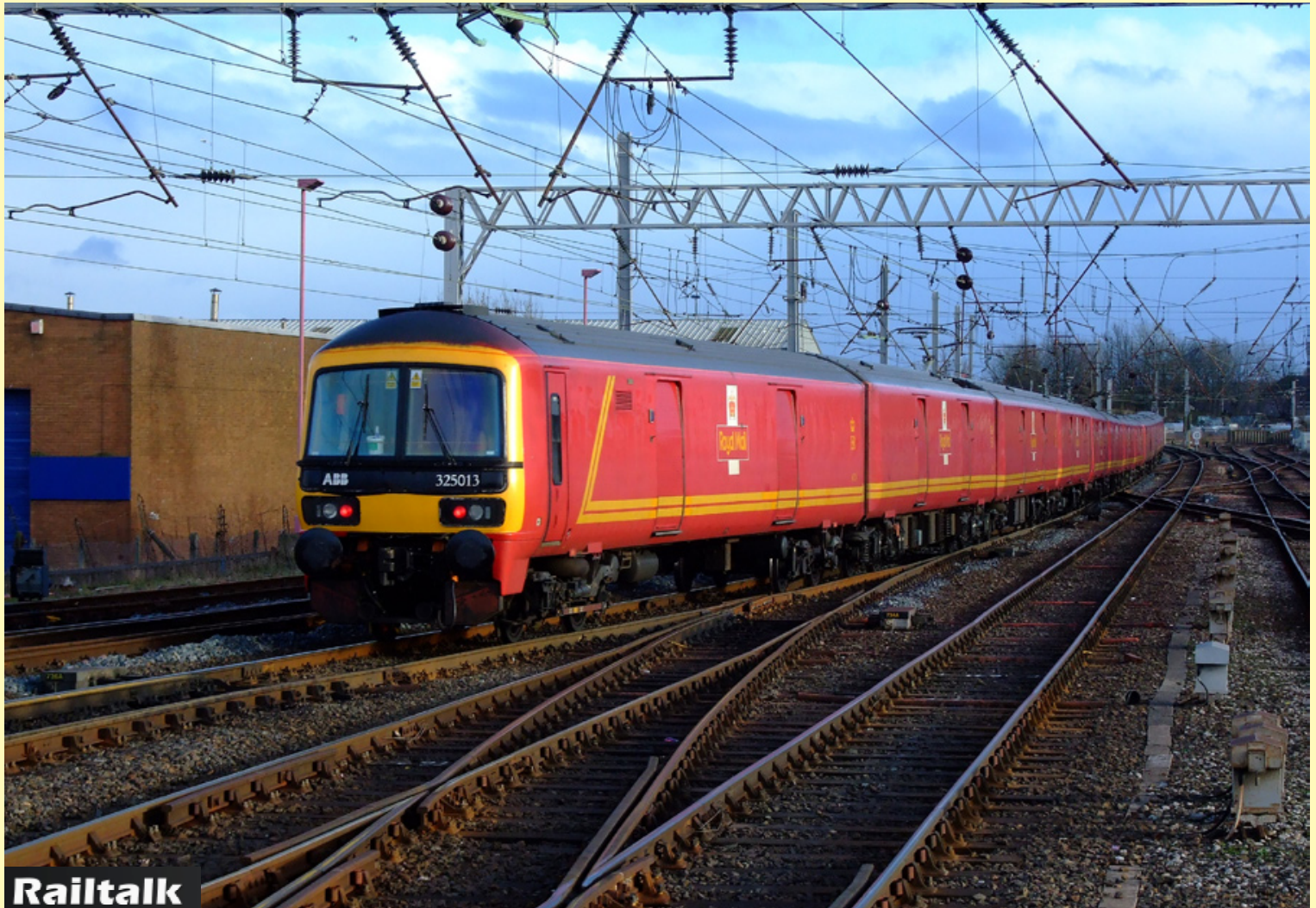
Below: It is pleasing to see that GBRf have won more mail contracts, Class 325 013/001/015 are seen departing Carlisle station working the 15.34 1M44 Shieldmuir Royal Mail Freight Terminal - Warrington Royal Mail Terminal on the 12th March.