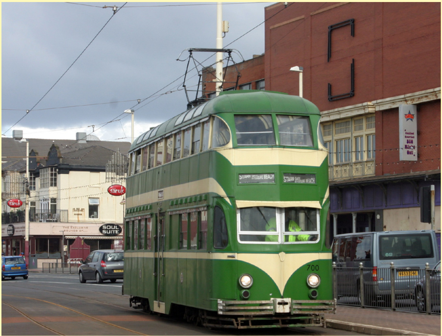
Above: The Blackpool Tramway is back in business. These two shots were taken on one of the first days back after the long closure for repairs and we can all now look forward to a tramway that has a bright future. The announcement of new modern trams will not please everyone, but at least it should assure people that the tramway is here to stay.