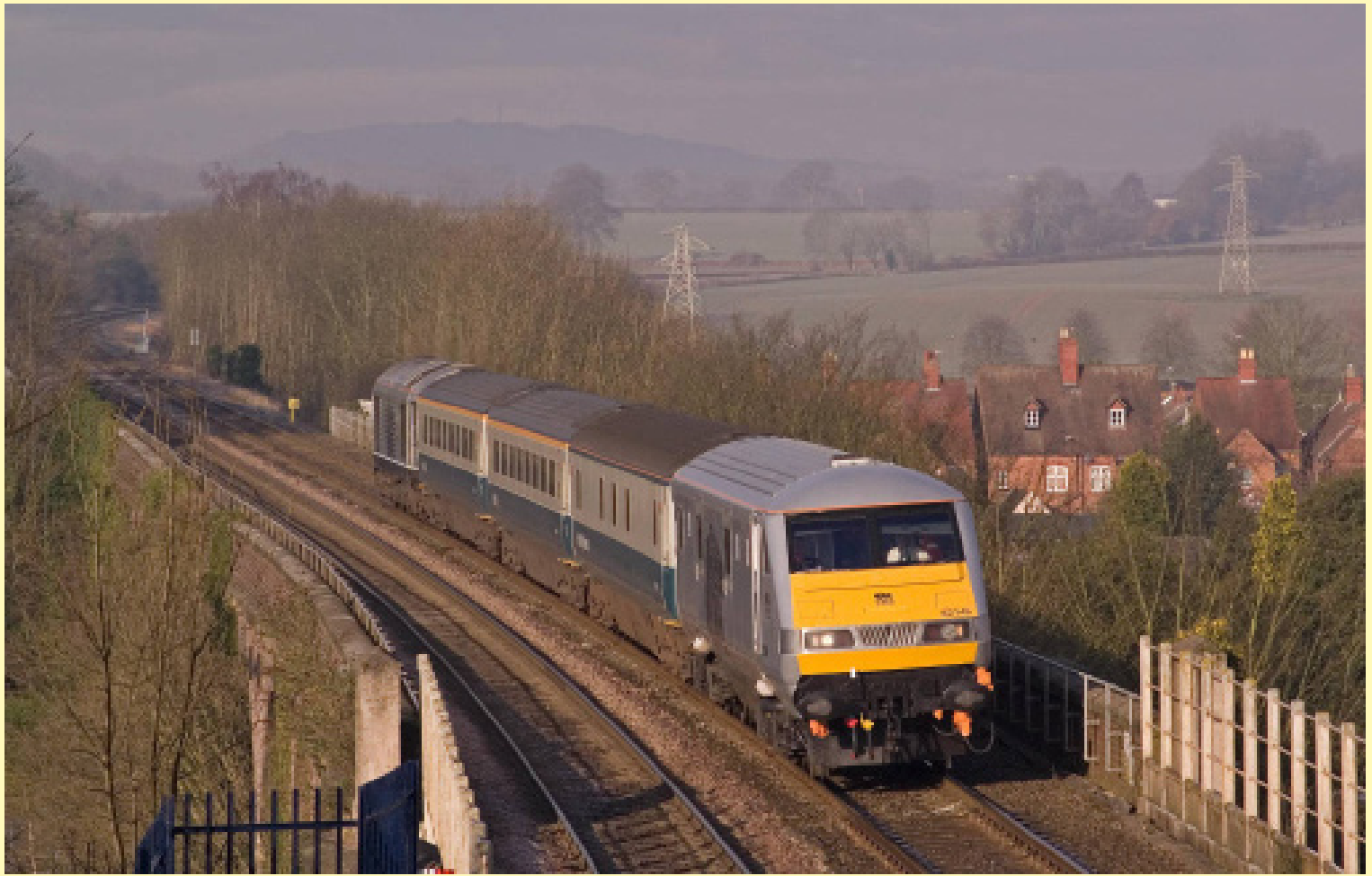
Above: With 82146 leading and 67 029 pushing from the rear, this is 5Z62 Crewe - Wolverhampton passing Shifnal on the 05 March. Carl Grocott Below: Early morning mist at Dawlish as 47 237 drags HST powercar 43175 and barrier coach up past Langstone rock to Brush on the 18th March. Liam