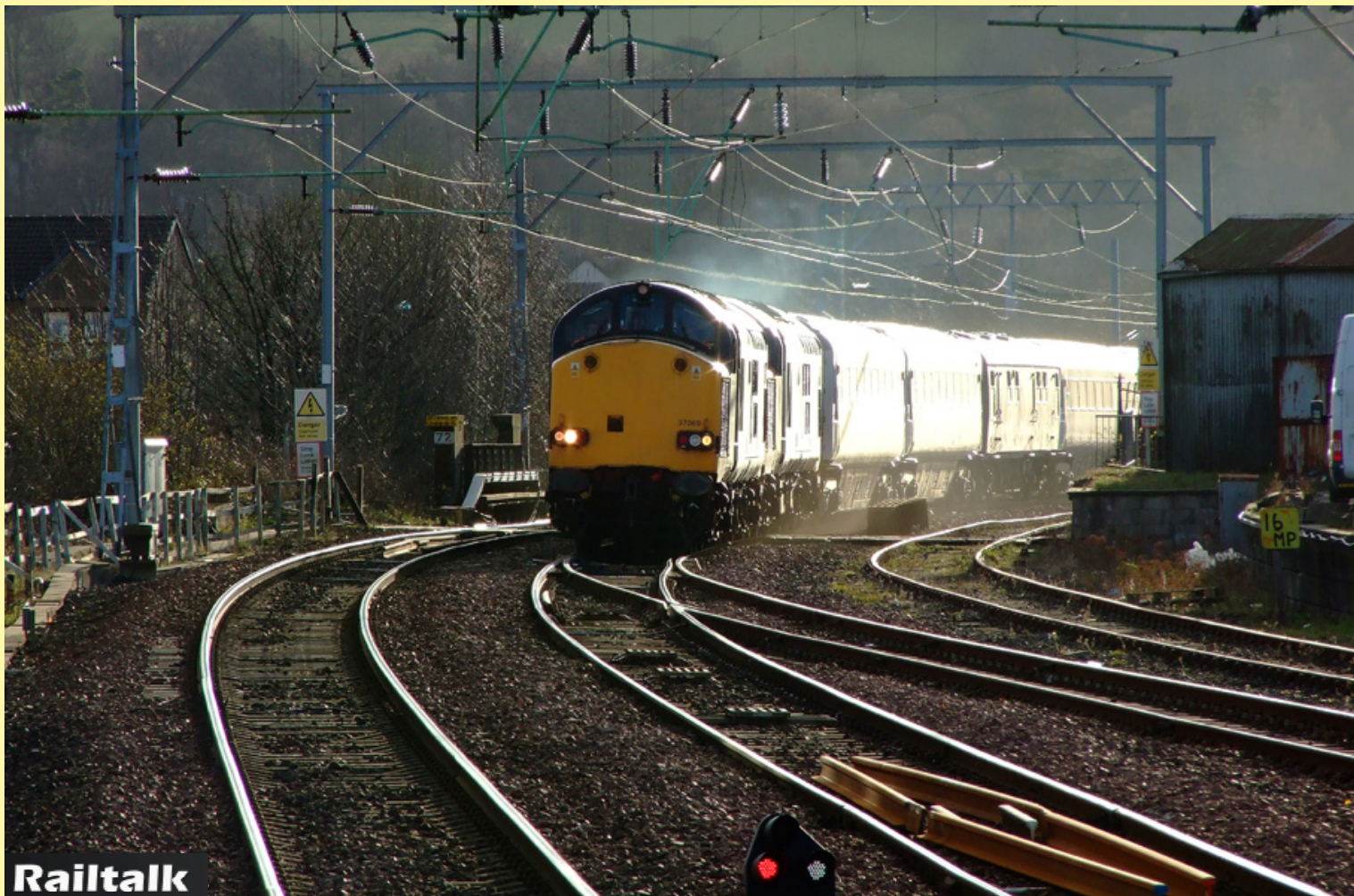
Below: Class 37 069 and 37 423 are working the 5Z44 Polmadie - Dumfermline Central, seen approaching Dumfermline on the 22nd March. Jonathan McGurk