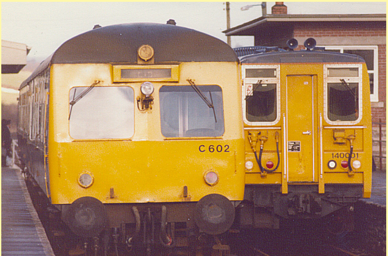
Above: One wonders what the rail companies of today would make of the unit on the right. Class 140 001, the prototype of the Pacers, with a front end that looked more like an EMU than a DMU, only had a short life before giving way to the Class 141's and Class 142's. Now in preservation at the Keith and Dufftown Railway, it is seen at Llandeilo along with DMU C602 in 1982.