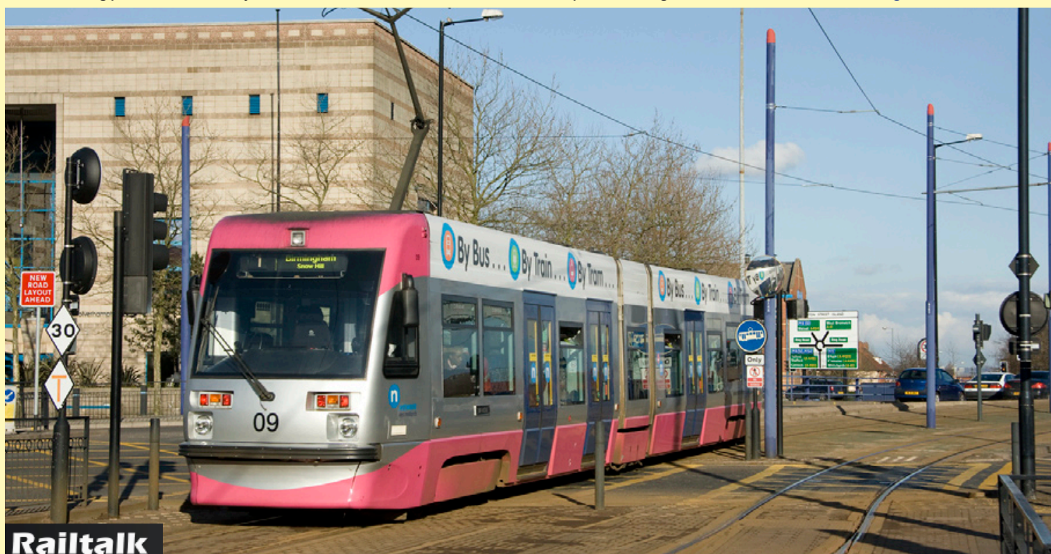
Below: Striking pink and silver livery, Midland Metro Tram 09 works into Wolverhampton St. Georges on the 27th March.