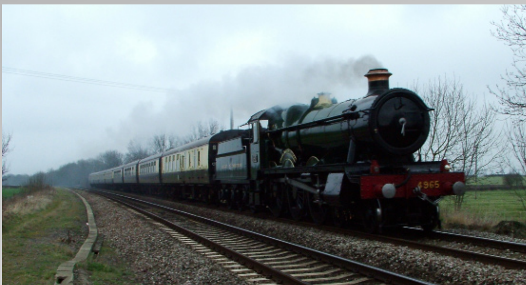
Left: 4965 "Rood Ashton Hall" passing Great Bourton with the 1243 from Tyesley to Didcot on the 15th March.