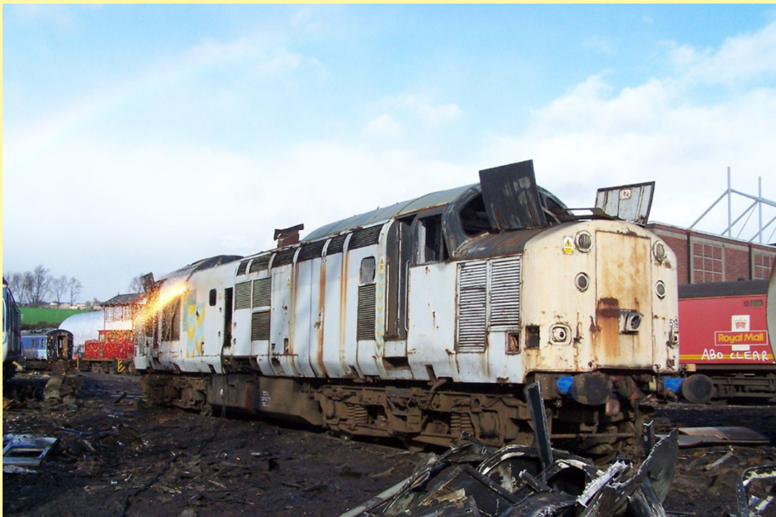
Above: "Another one for the chop" Class 37 519 is just starting to be cut apart in this shot, taken at C F Booths on the 1st March. Below: Will Class 37 411 ever work again, after the derailment at Immingham, mentioned in last months issue, the loco has now suffered engine problems and is seen here at Warrington Bank Quay where it is awaiting its fate. Class 37 401 can just be seen at the back of the depot.