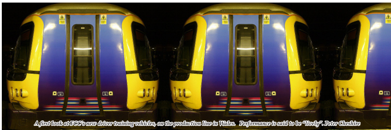
A first look at FCC's new driver training vehicles, on the production line in Wales. Performance is said to be "lively".