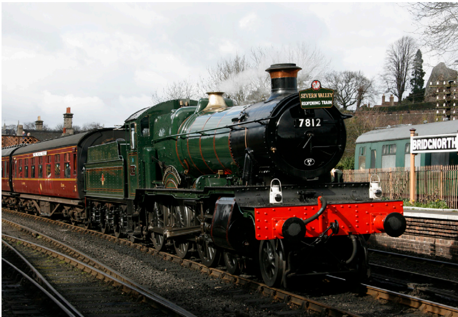
Above: Welcome back to the Severn Valley Railway. After a year when the line was crippled by flooding and landslips, the line finally reopened along its entire length on 21st March. 7812 Erlestoke Manor is seen at Bridgnorth with the "Severn Valley Reopening Train".