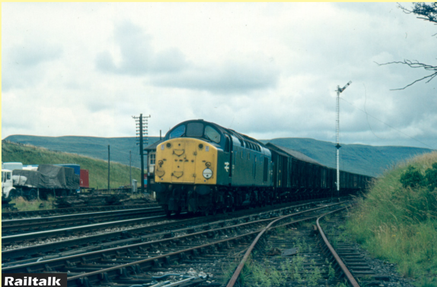
Below: On 4th August 1973, Class 40, No. 323 approaches Kirby Stephen West on a southbound freight. Freights were frequent over the Settle and Carlisle Railway still at this time, even on Saturdays! The route was very useful for some of the North/West freight traffic, as they could be diagrammed at the slower speeds required instead of having to be slotted in on the West Coast Main Line between express passenger trains.