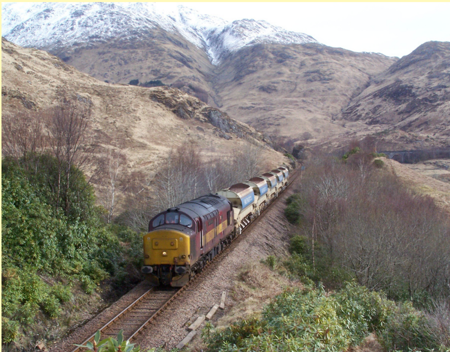
Above: Highland splendour on the 26th March as Class 37 417 works the 6K66 Fort William - Glenfinnan. The train has just crossed the Glenfinnan Viaduct and is heading towards Glenfinnan station.