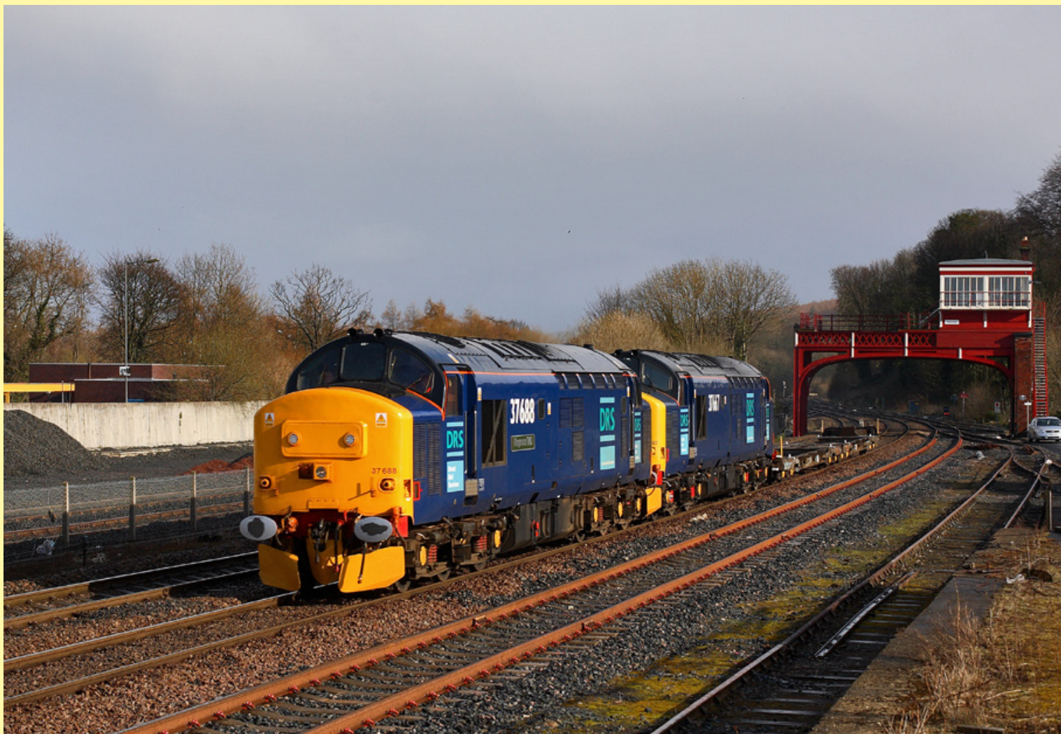
Above: 37 688 and 37 667 are seen working 4Z44 past Hexham on the 12th March.