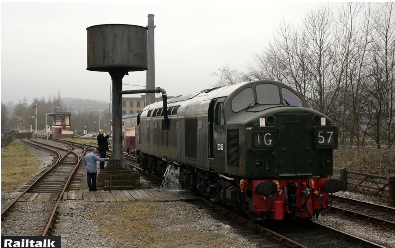
Below: A sight that was once common on the mainline is the filling of boiler water tanks, for steam heating. With the advent of electrically heated coaches, the mainline has been extinct of this practice for many years. This is Class 40 D335 having its boiler tanks replenished. Jon Jebb