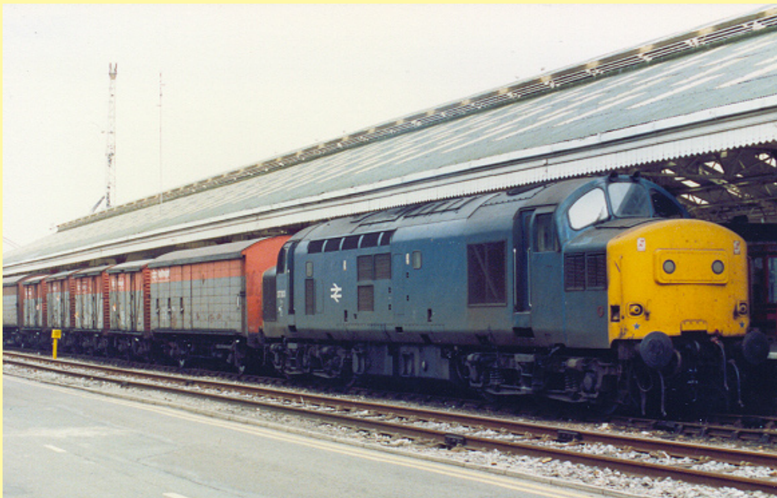
Above: Class 37 303 is seen on arrival at Fishguard with a Speedlink freight in September 1986. Peter Cheshire