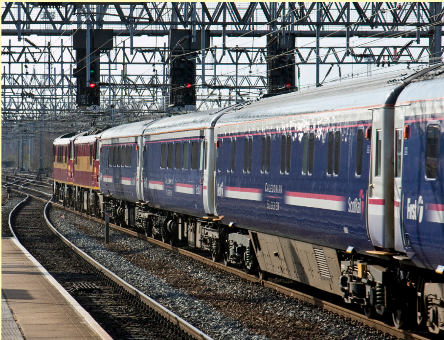
Above: March started bad for the Scotrail sleeper service, both southbound services were abandoned in the midlands owing to signalling problems. They didn't finish much better as this shot shows, this is the southbound 1M11 with Class 90 018 and 90 026 passing Crewe at about 09.15 on the 29th March. Class47 Below: Class 60 044 works a Ratcliff - Warrington/Liverpool Bulk Terminal coal train through Crewe heading north on the 29th March. Jon Jebb