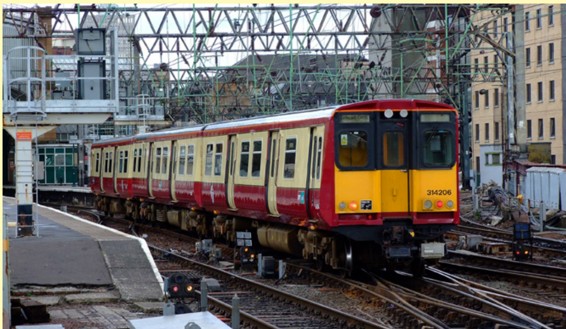
Left: Class 314 206 is seen going through into Glasgow Central High Level station working the 10.40 2020 Glasgow Central High Level - Glasgow Central High Level Cathcart Circle via Maxwell Park service on the 14th March.