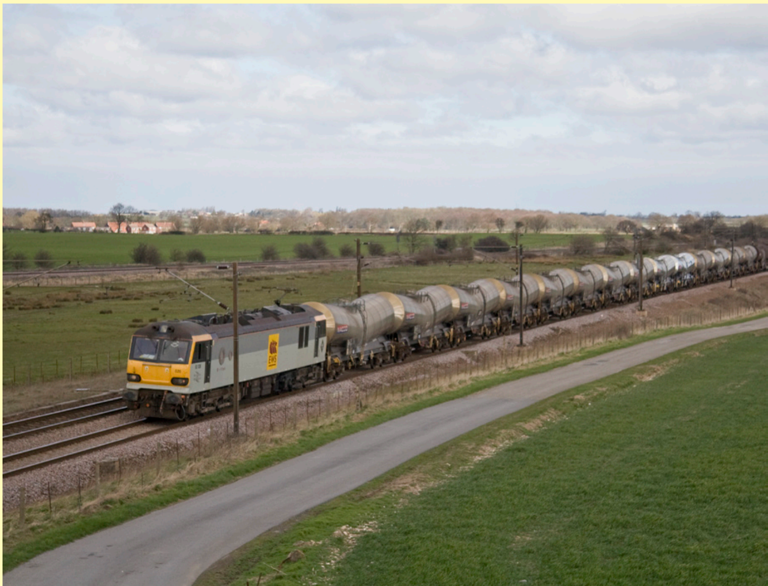
Above: Diverted via the East Coast due to engineering work on the 21st March, was 92 026 on the 6O60 Mossend - Wembley "Silver Bullet" working. Andy Below: Making a change from green or red on the coals, are the GBRf workings between Tyne Dock and Drax, seen here with 66 711, south of York.