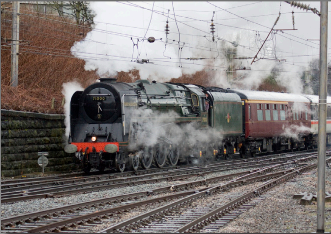
Left: The Cumbrian Mountain Express operated from Liverpool Lime Street to Carlisle. This is 71000 'Duke of Gloucester' as it approaches Preston on the 8th March. Class47