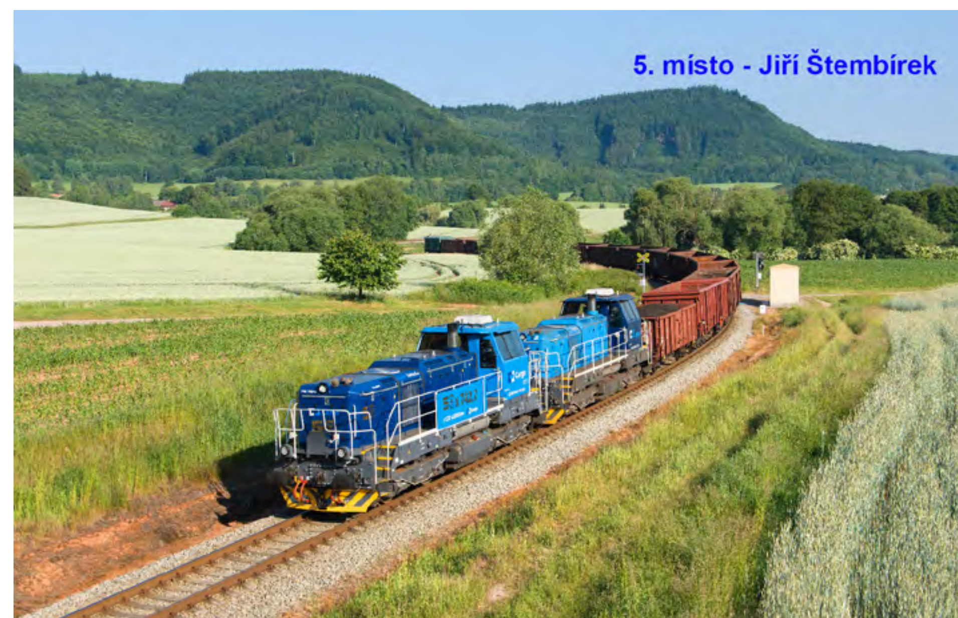
5. místo - Jiří Štembirek