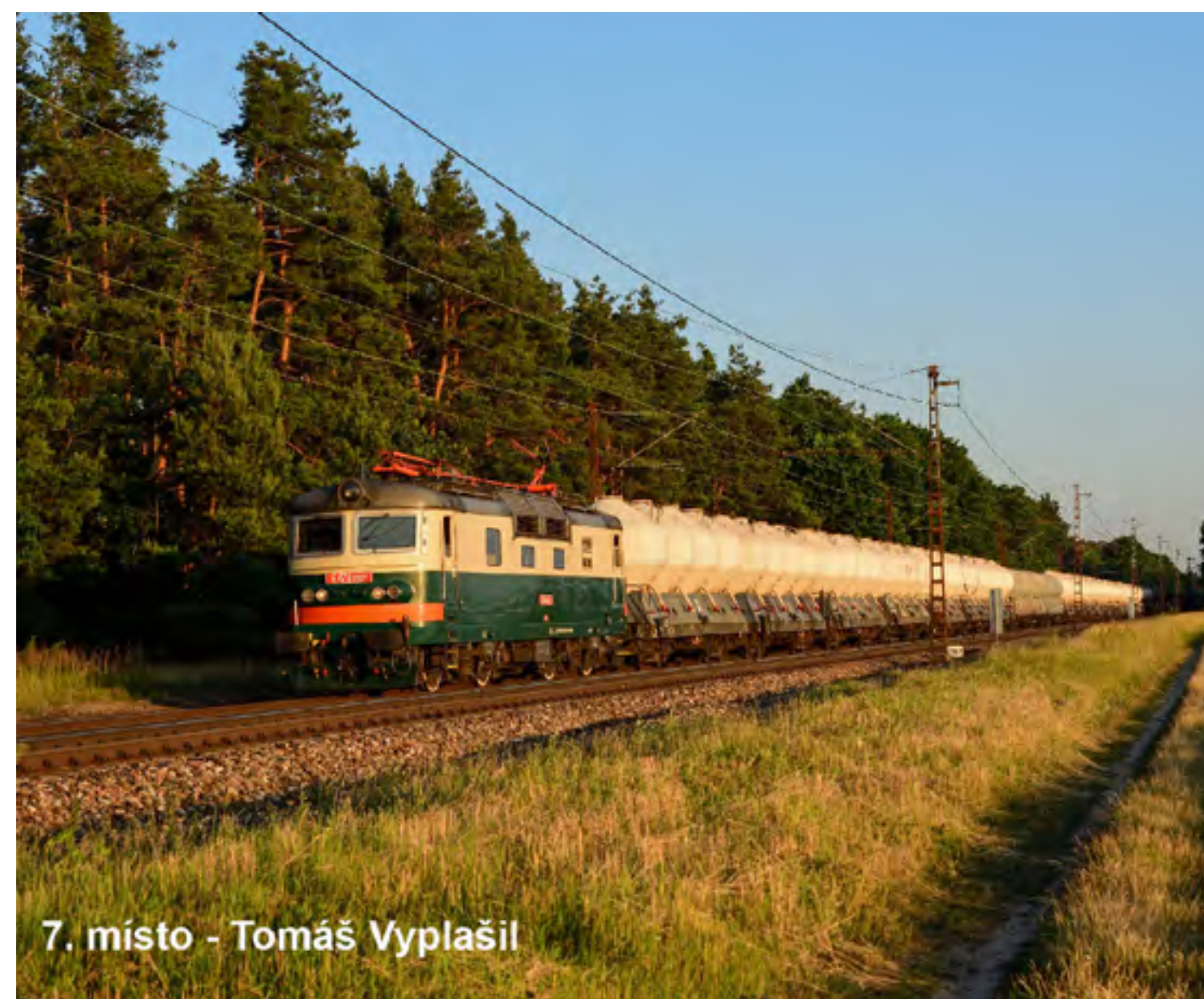
7. místo - Tomáš Vyplašil