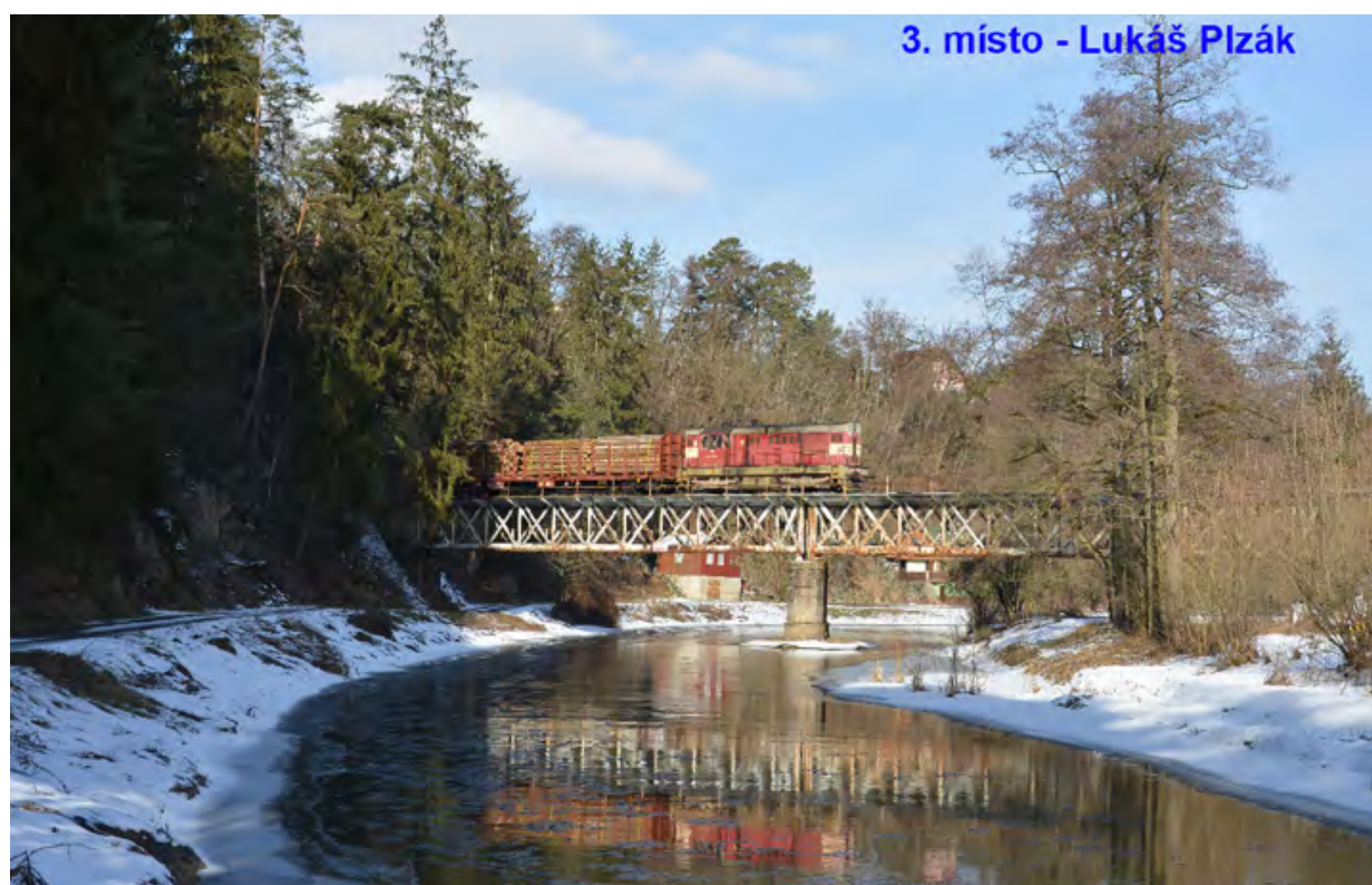
3. místo - Lukáš Plzák