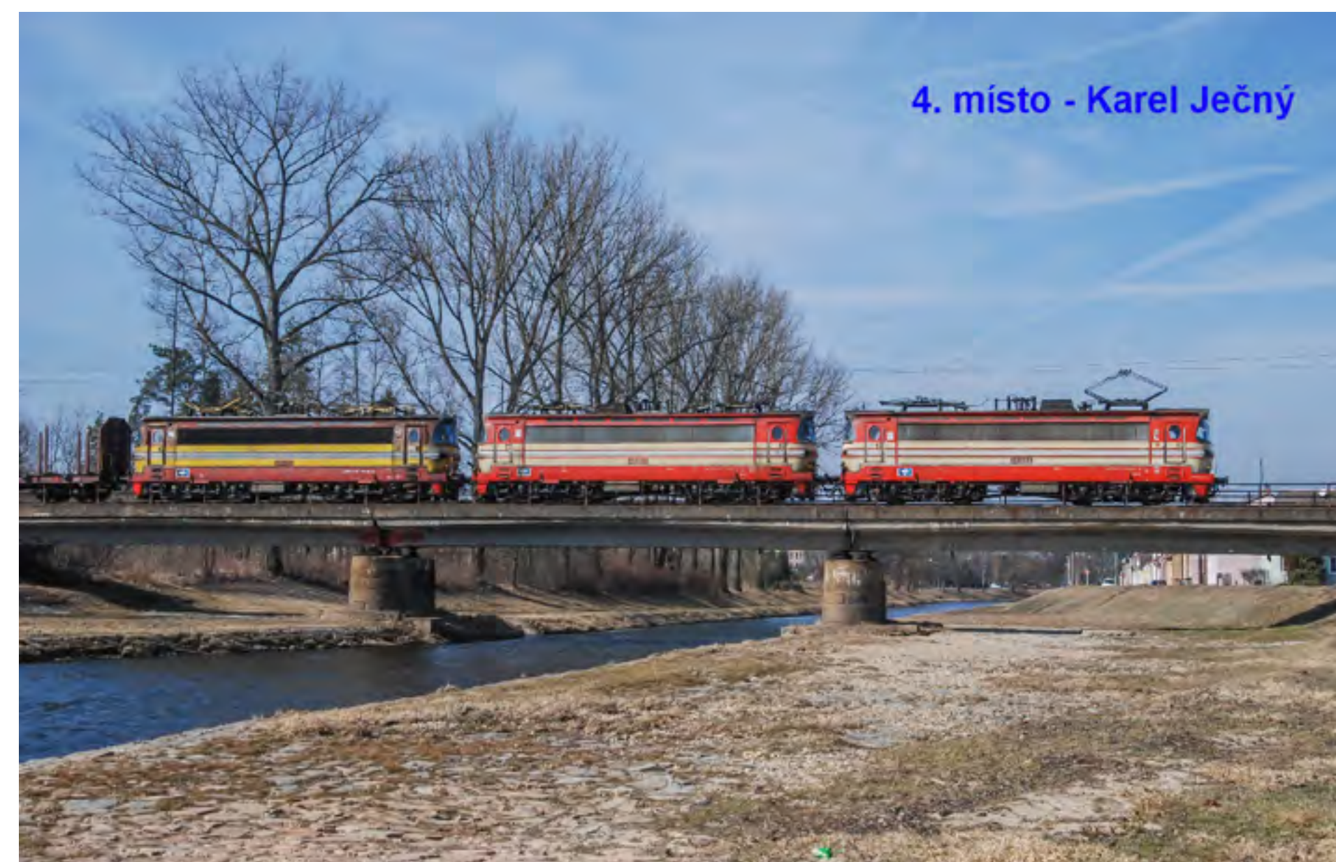
4. místo - Karel Ječný