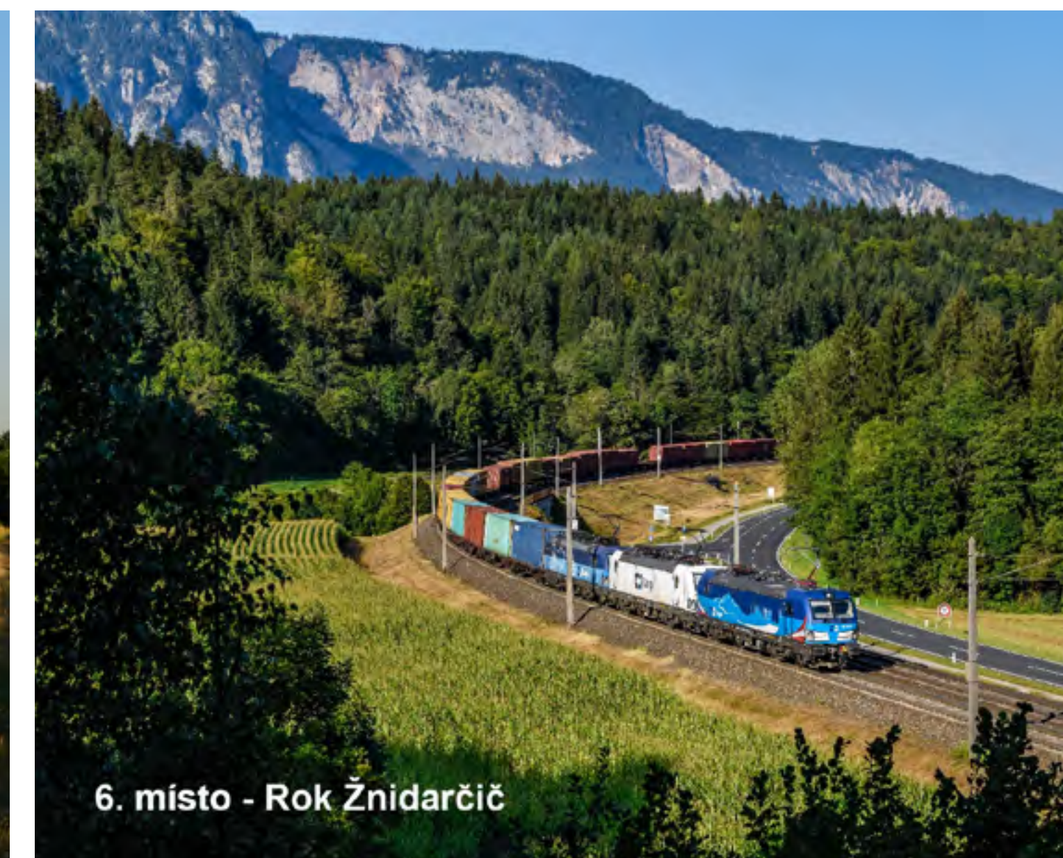
6. místo - Rok Žnidarčič