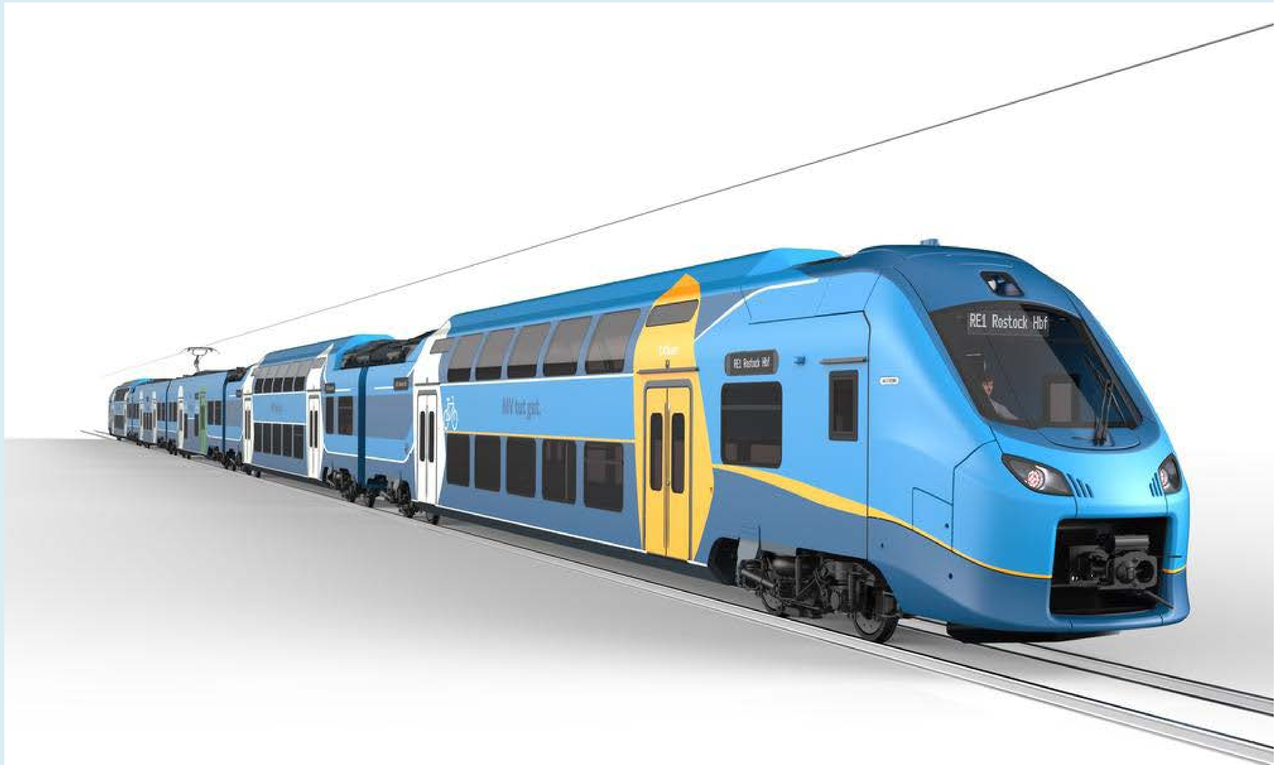
Image: The new Coradia Max trains will operate among others on the highly popular regional express line RE1 between Hamburg and Rostock, in the Baltic Sea-Alster sub-network (OSTA) – Non-contractual design for illustration purposes

[2] Order booked during third quarter of fiscal year 2023/24