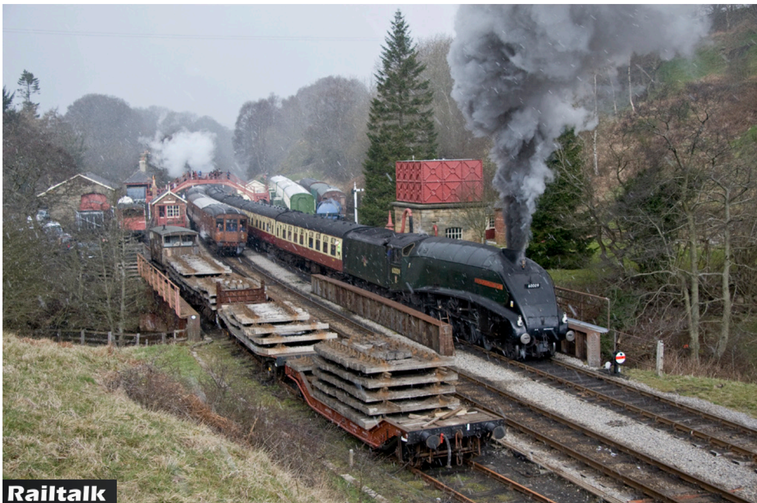
Below: Almost the same shot, but what a difference a week made. Just as the snow starts to fall "Union of South Africa" departs Goathland. Andy