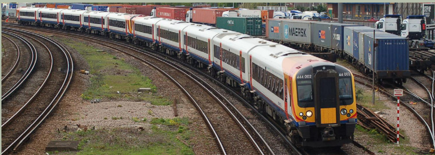
Below: Class 444 002 leads another classmate past Millbrook into Southampton Central. Both © James Paice.