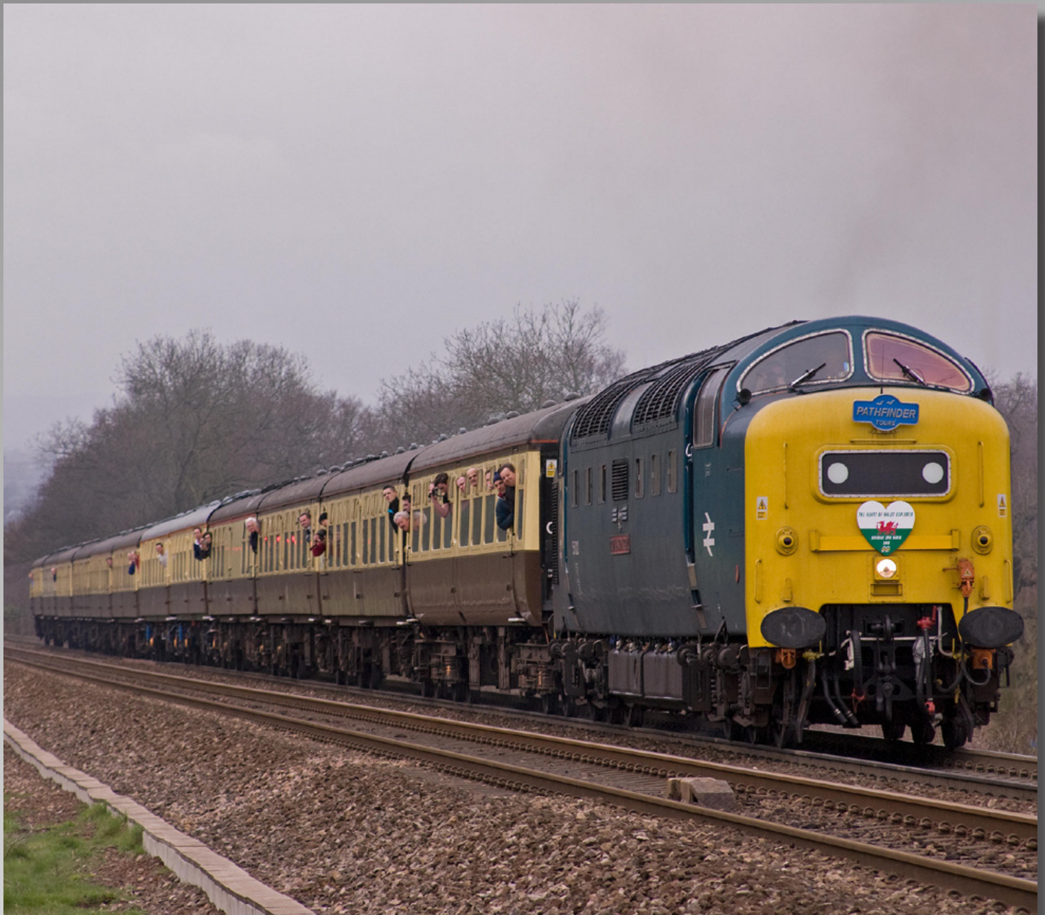
Bottom: I know, before you all start, that this tour was last month, but this shot was too good not to include. Deltic action on the main line with Class 55 022 working 1Z47 Cardiff - Llandridod Wells passes Vigo. Carl Grocott