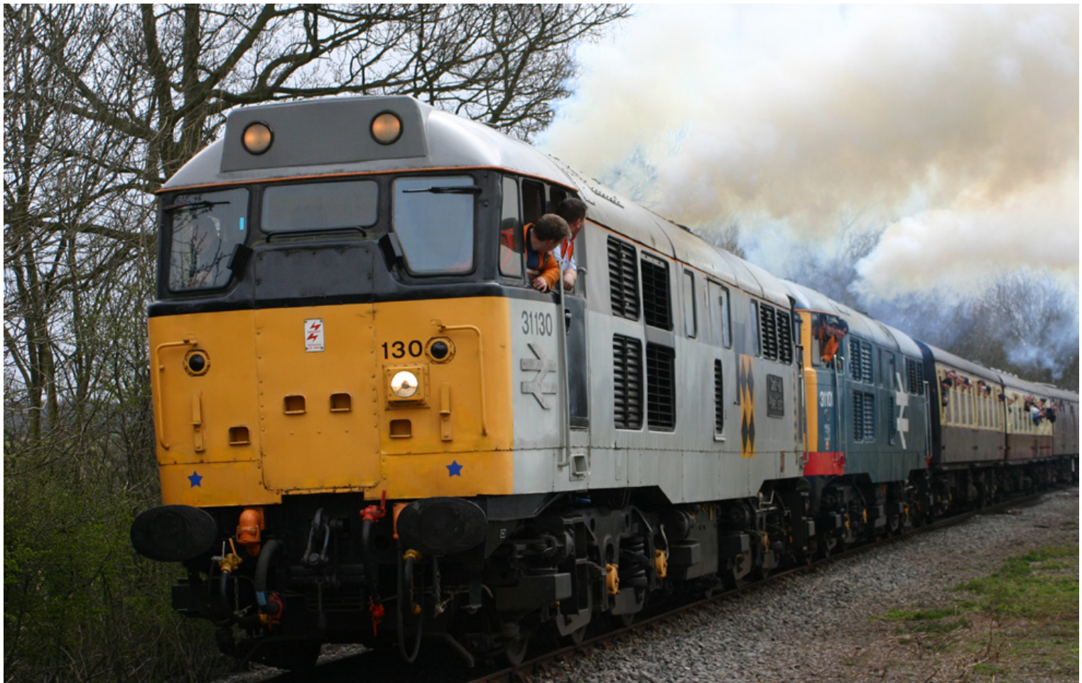
Below: Clag, clag, and more Clag, from this pair of Class 31's at the Battlefield Line in April. ( Well they were pulling a dead Slug as well as a fully loaded train!) Peter Cheshire