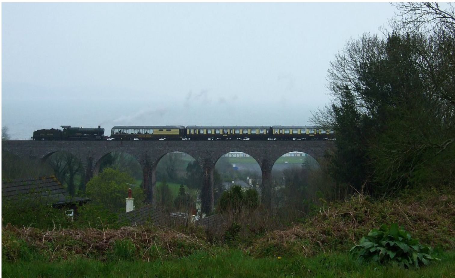
Above: On the weekend of the 20th April, the Paignton & Dartmouth Railway held a heritage weekend. This is Lydham Manor descending down towards Paignton over IK Brunel's Hook Hills Viaduct.