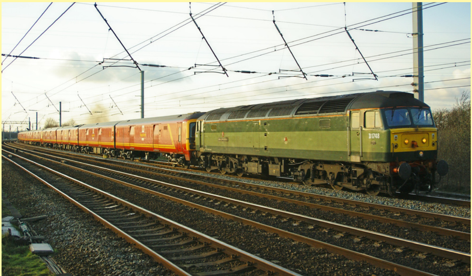
Above: Class 47 815 "Great Western" on the late running Sheldmuir-Wembley postal. Running approx 45 late, it is seen hauling the Class 325 units through Winwick Jct. on April 8th.