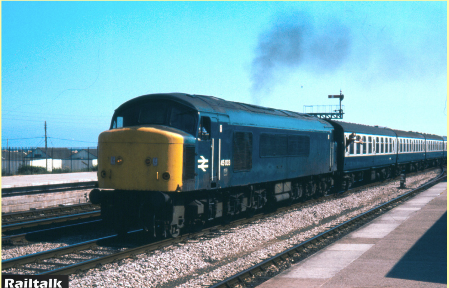
Below: On 30th June 1984, Class 45 033 heads the 15.04 Paignton - Nottingham service through Dawlish Warren with at least one passenger letting us know he was enjoying the experience! !.