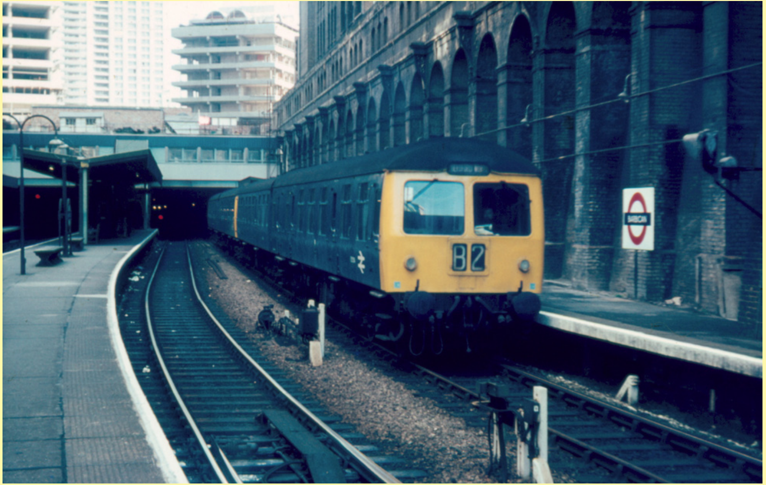
Above: Eastern Region Suburban 2 car d.m.u.'s operated the Metropolitan Avoiding Lines when steam traction was abolished on services to and from Moorgate. On 8th November 1969, two units are seen here at Barbican on a Hertford North service. Today the line is overhead and served by First Capital Connect services. David Mead