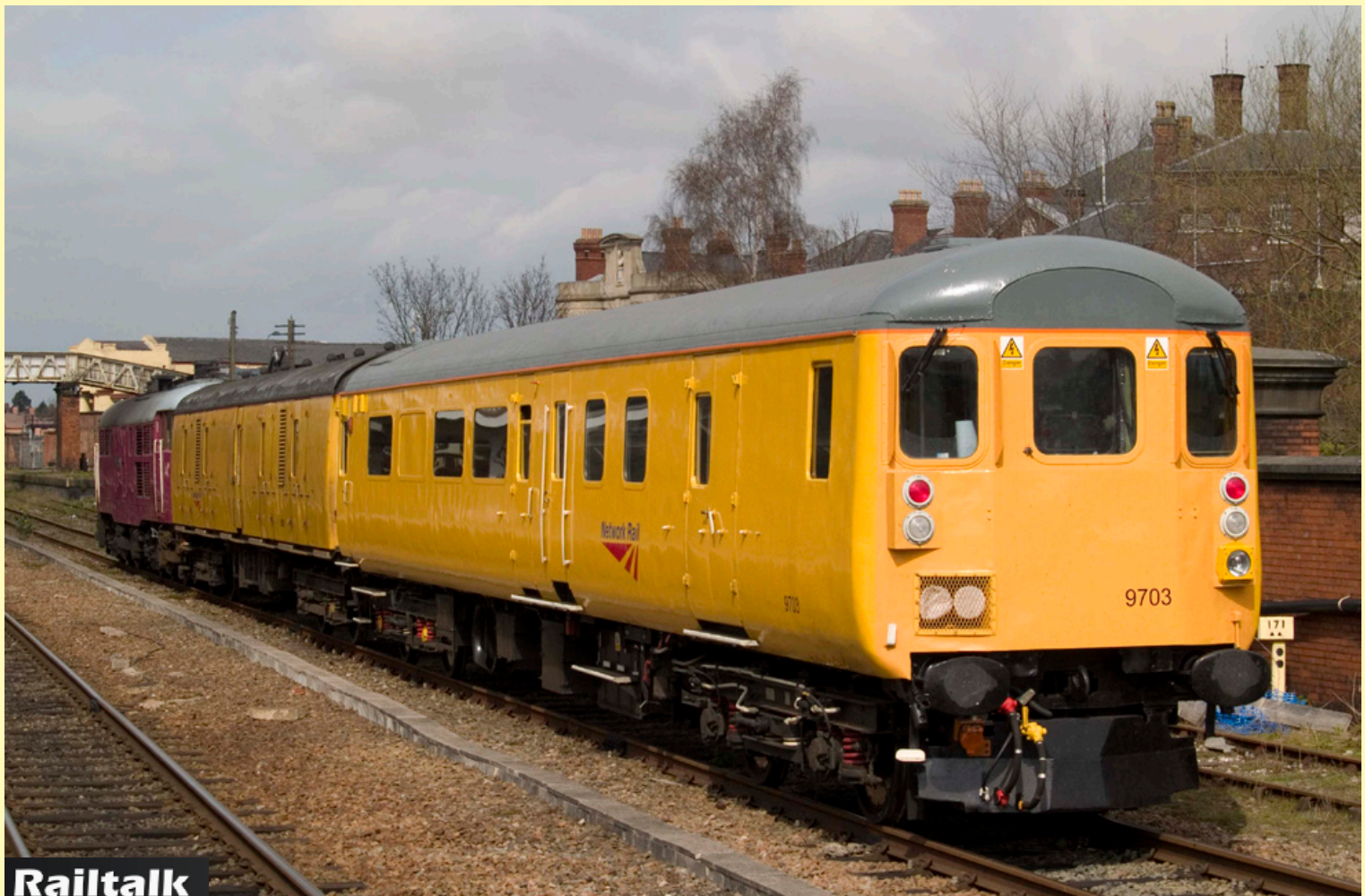
Below: Trials continue with the Class 31's and modified DBSO's, with a view to eliminating top and tail.. This is Class 31 601 at Shrewsbury. David Dawson