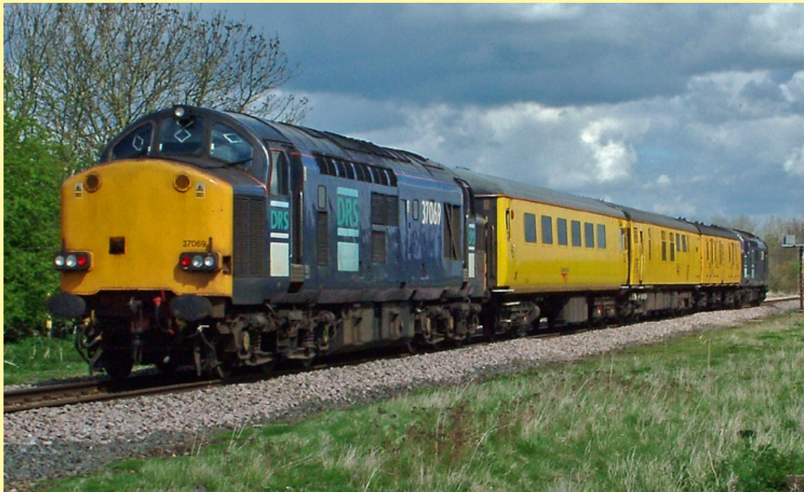
Left: We have been told that this could be the last daylight running of a Serco Test Train in t&T mode as it is expected that the DBSO units are to enter service soon. 37069 brings up the rear of 4Q08 Kettering to Derby with 37609 leading at Glendon Junction on Monday 28th April. Derek Elston