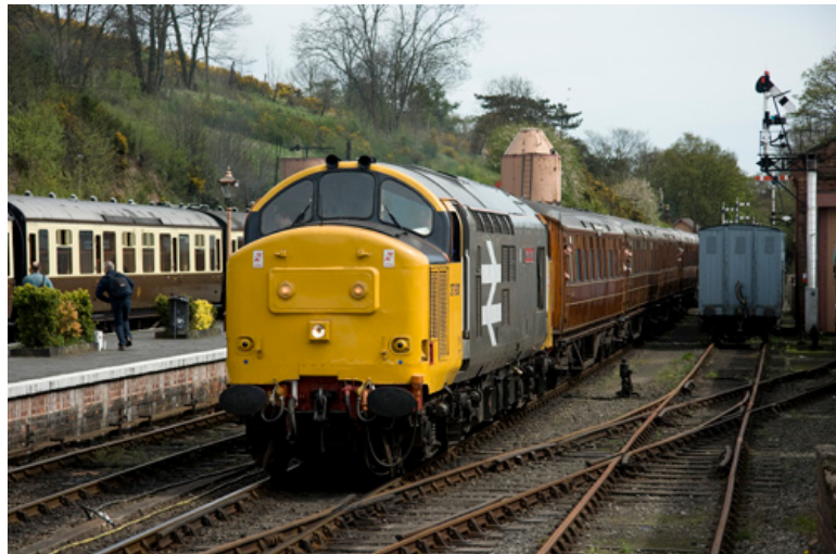
The Severn Valley Railway held it's Deisel Gala in April this year, previously this was held in the Autumn. The railway is now running a full service once again, following the disasterous floods last year, that did so much damage.