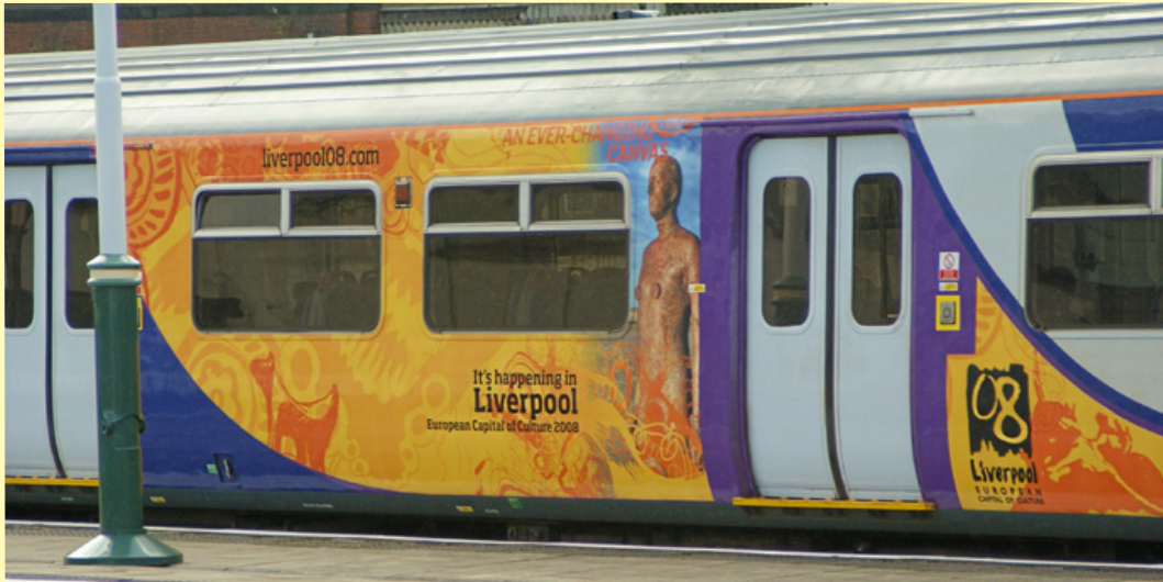
Left: Seen at Manchester Piccadilly on April 2nd, this Class 150 is one of three units with special decals to promote Liverpool's Capital of Culture. This one is 150 147 with the Art & Sculpture theme of an "Ever Changing Canvas".