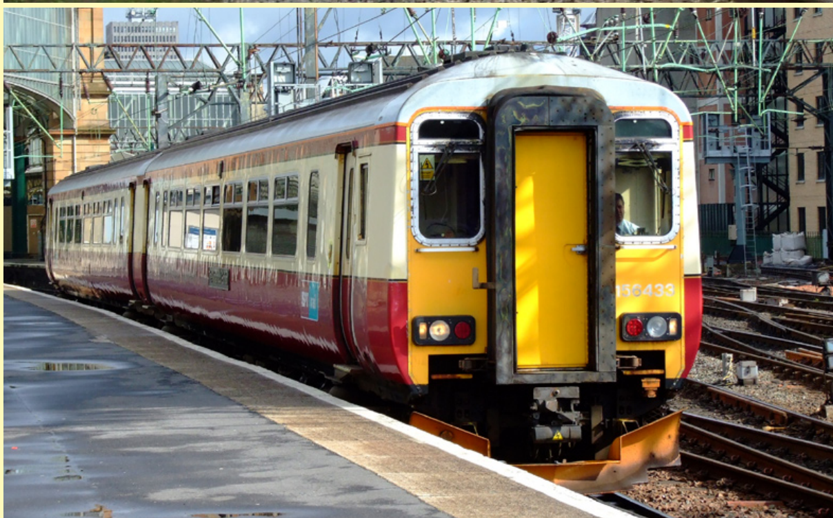
Left: Class 156 433 is named 'The Kilmarnock Edition' and carries a slightly different livery, seen here departing Glasgow Central High Level station working the 10.37 2D19 Glasgow Central High Level - Paisley Canal service on the 15th April. Jonathan McGurk