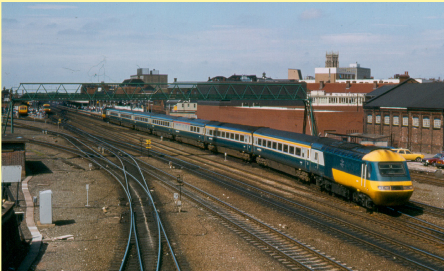
Above: In 1984, electrification of the East Coast Main Line from London Kings Cross to Edinburgh had been announced and by 1991, the whole route had been electrified with overhead making looking down photography very difficult through the catenaries and poles etc. However, on 28th July 1984, Doncaster was a wire free area and here I took an uninterrupted view of a southbound H.S.T. departing Doncaster.