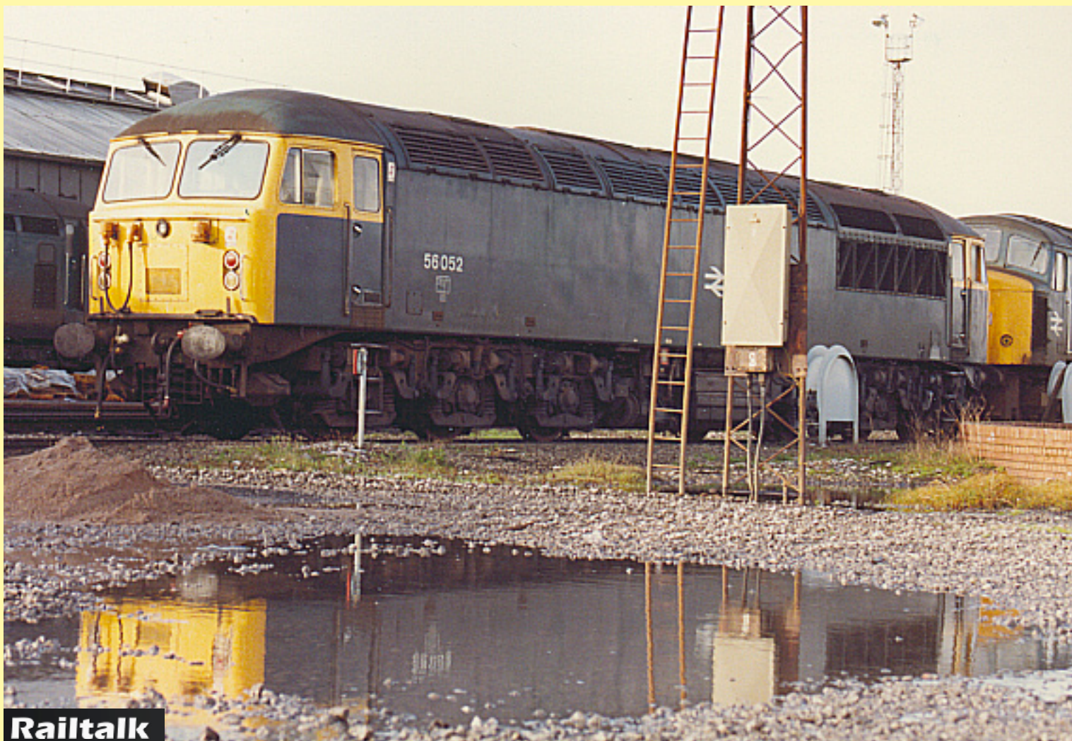
Below: Class 56 052 is pictured at a wet and soggy Margam during a visit in 1986.