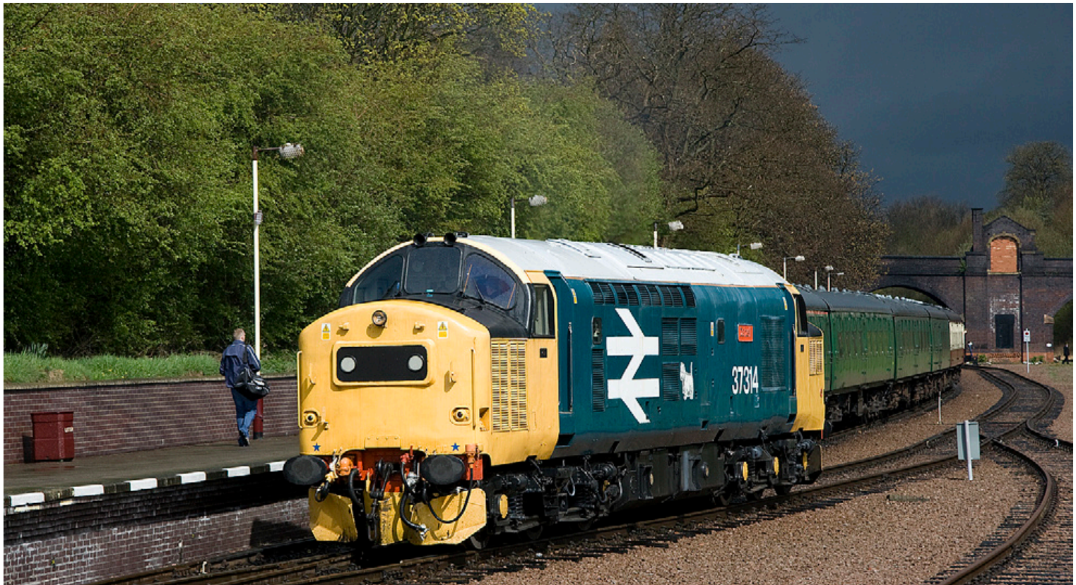
Above: Under a very dark sky Class 37 314 runs round its train at Leicester North, during the Great Central's Diesel Gala held in April. Left: Arriving at the line during April, after the Gala, was Class 37 198, for storage.