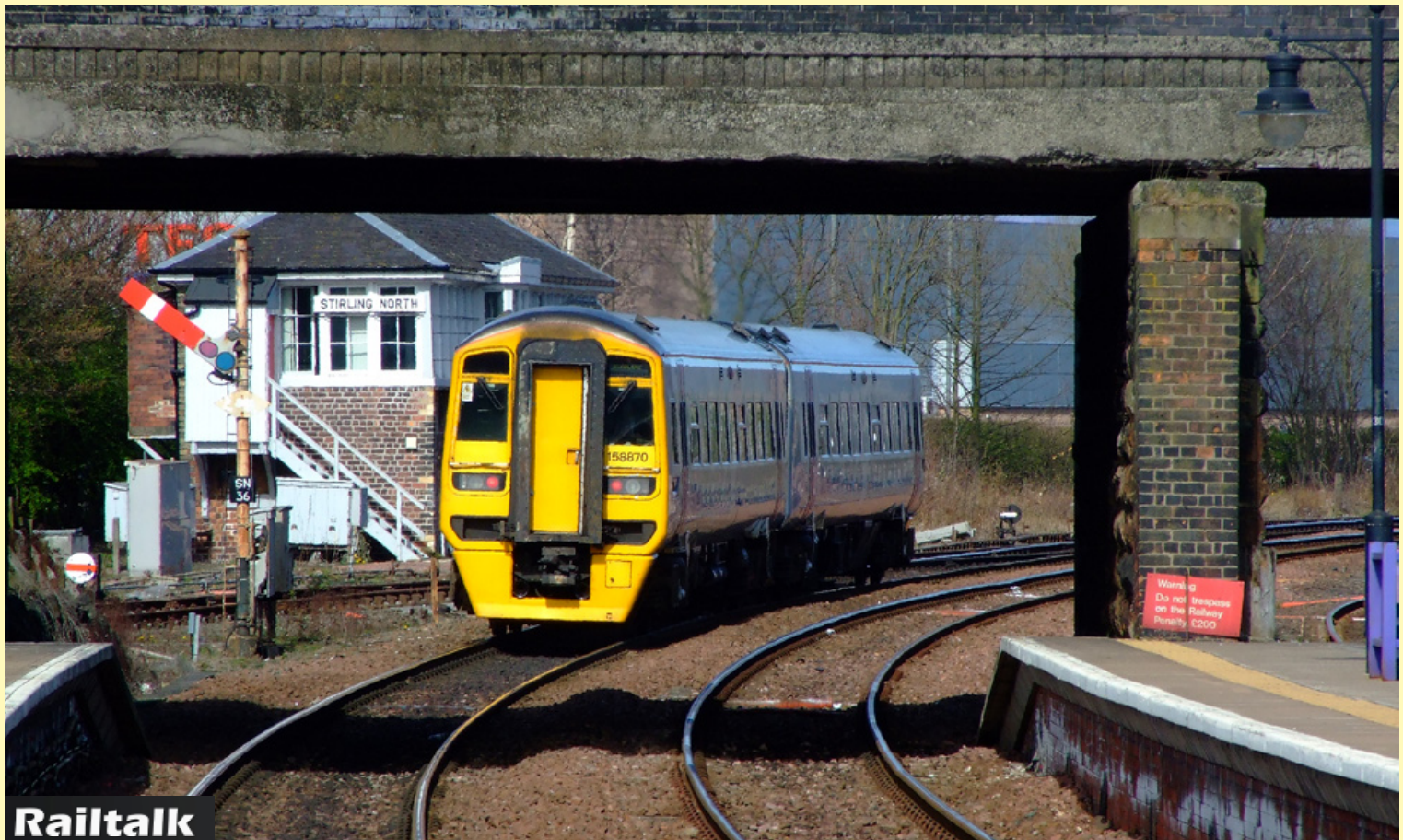
Below: Class 158 870 in Wessex livery has moved upto Scotland for good. This set was one of 5 which came up at the start of the year from Neville Hill Depot which were stored at Slateford Carriage Sidings for 6 weeks until they came out in service a few weeks ago. Class 158 870 is seen departing Stirling while working the 12.03 2P37 Edinburgh Waverley - Dunblane service on the 2nd April.