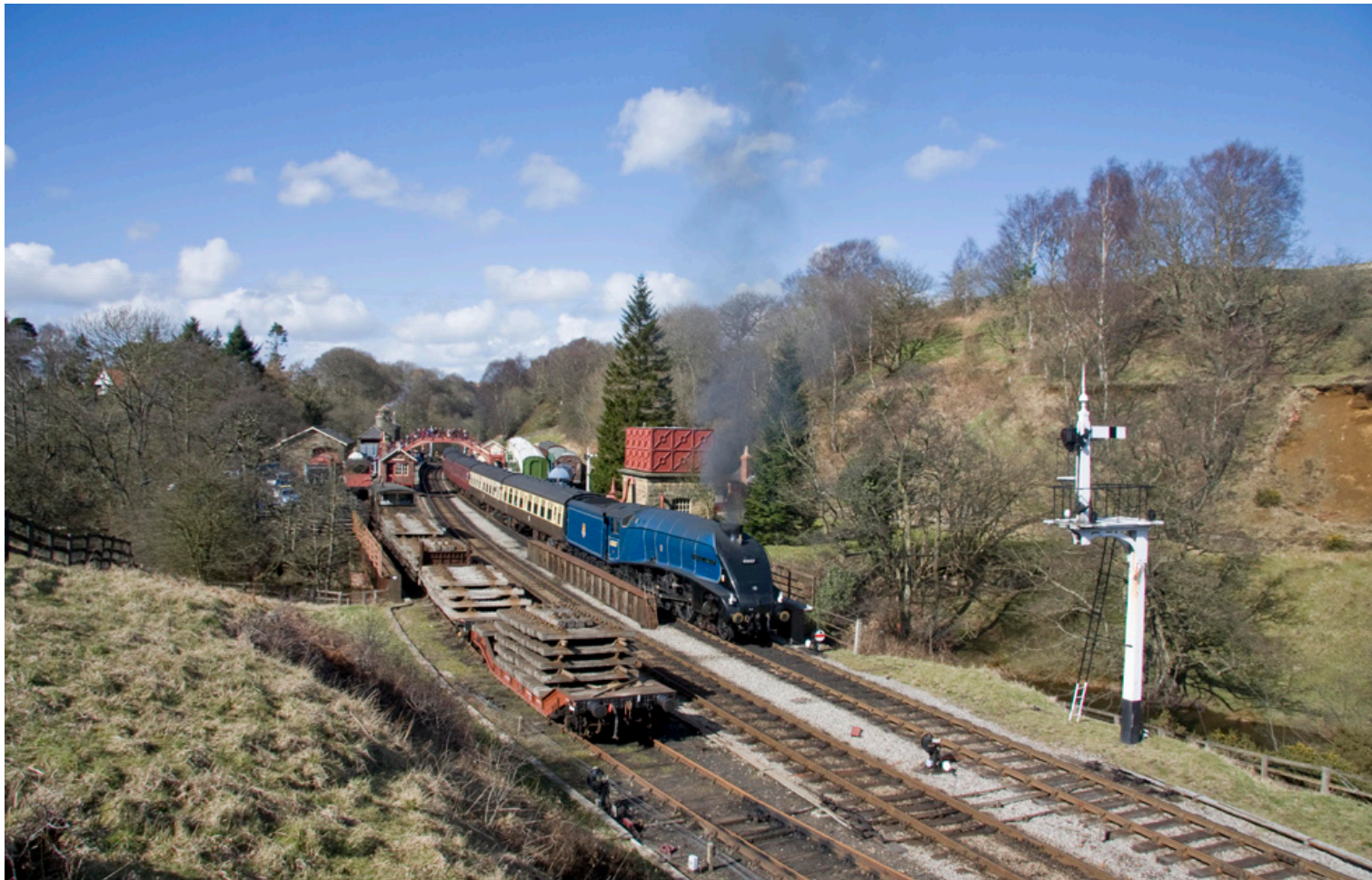
Above: With the station at Goathland in the background, "Sir Nigel Gresley" waits to depart towards Pickering on the North Yorks Moors Railway. As we said, their gala was held over two weekends and compare this shot, taken on the first weekend, with that of the one below.