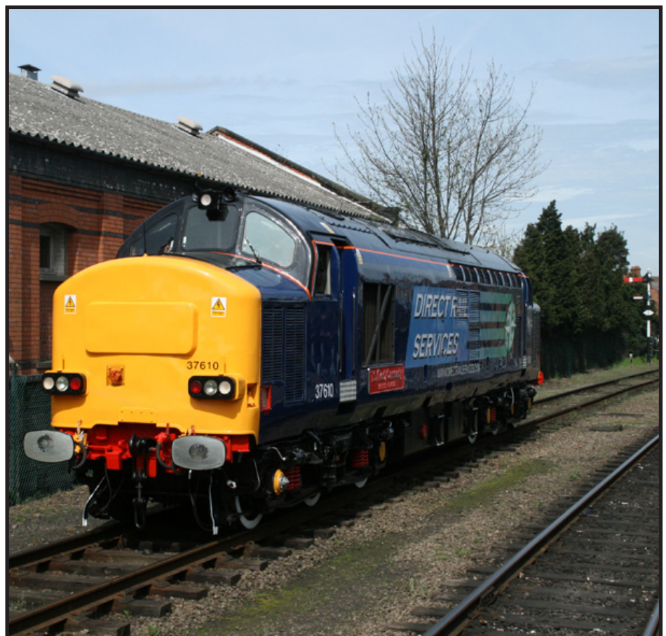
Right: DRS's Class 37 610 at the GCR.