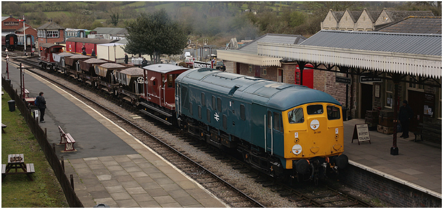
Above: Working a short freight through along the Gloucester and Warwickshire Railway is Class 24 081. Photographed at Winchcombe. Jon Jebb