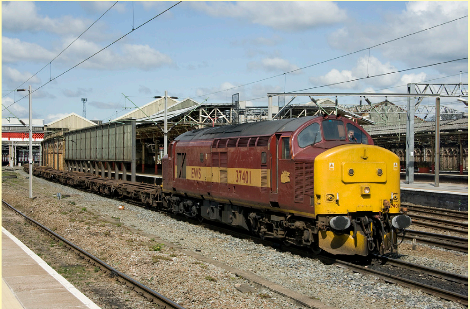
Above: Still plodding on, mainly with trip workings around the North West and occasional Railtour duties, Class 37 401 is seen at Crewe working the 6K16 Warrington Arpley to Crewe Electric on the 14th April.