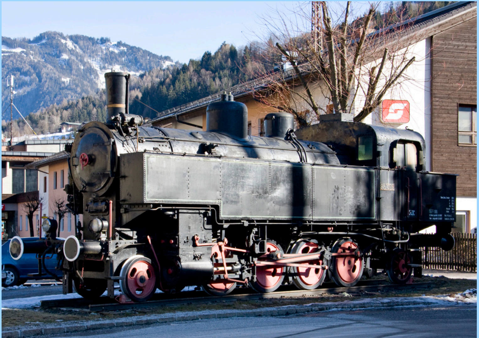
Above: In the beautiful town of Schwarzach-St. Viet, in Austria, stands this steam loco. Well kept and looking great, one wonders what would happen if we put a loco in such an exposed position in any UK town. Andy