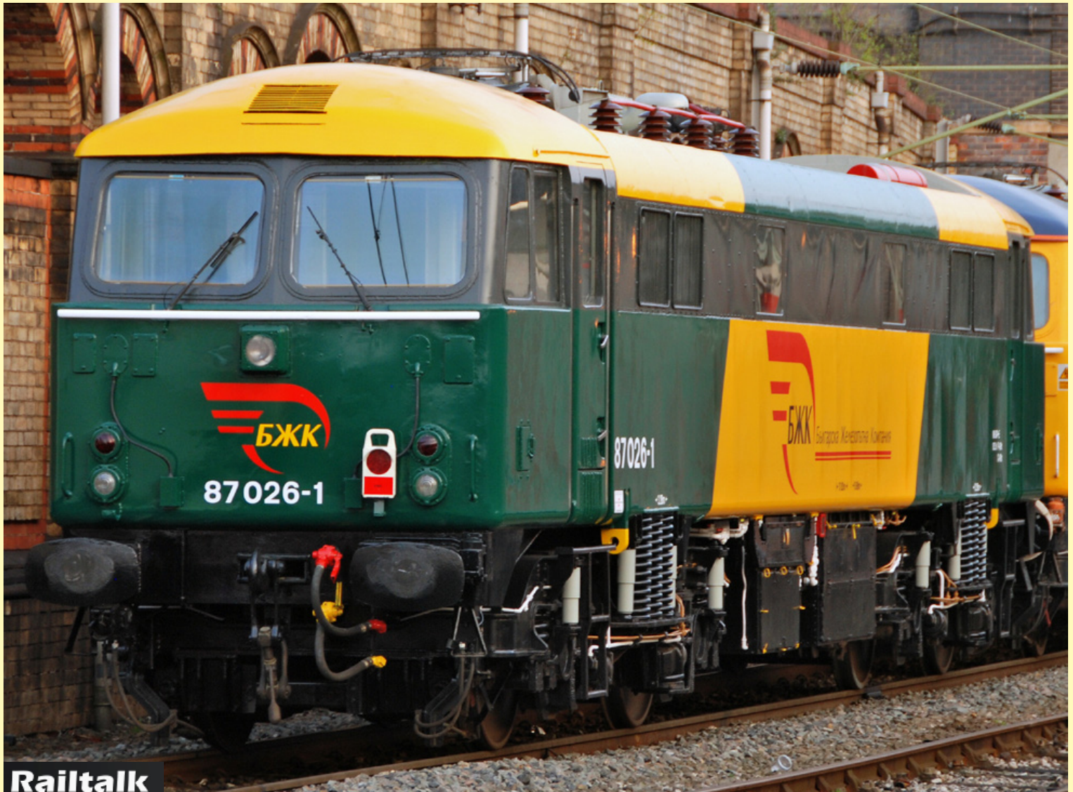
Below: Class 87 026 later in the day is seen at Crewe, where the Class 66 ran round the train. Ian Furness