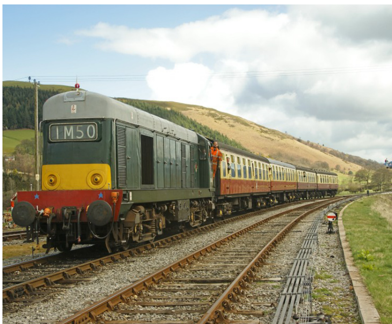
Below: The Llangollen Diesel Gala saw use of Class 20 D8142, Class 25 313 and Class 37's 240 and 901, all pictured in and around Carrog.