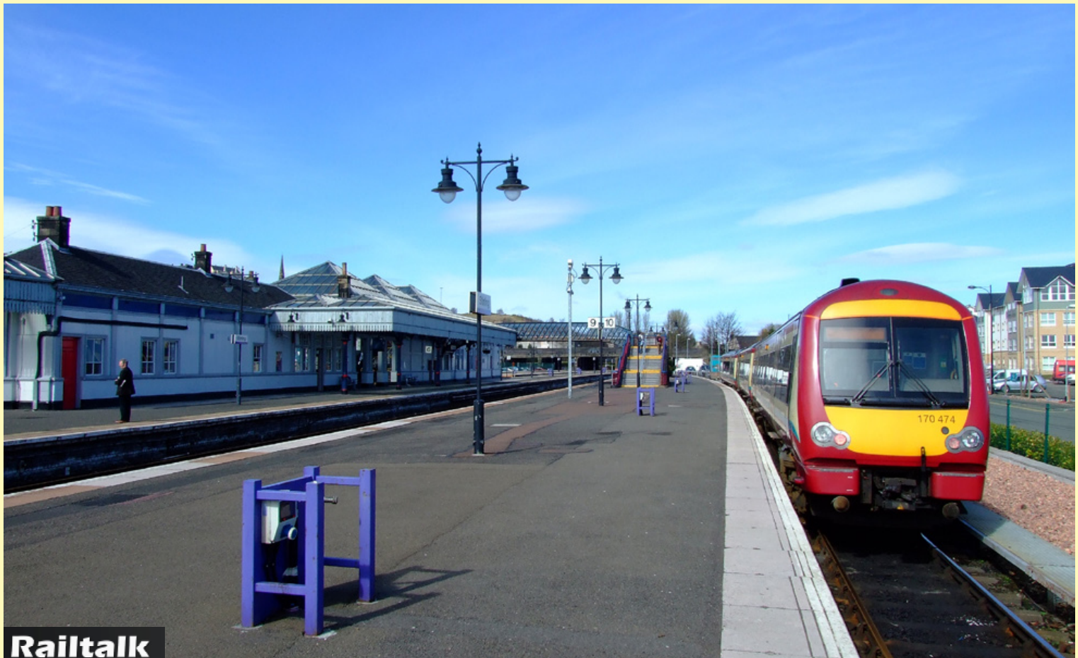
Below: Class 170 474 is seen sitting inside platform 10 of Stirling station having just come in with the 12.19 2N69 Glasgow Queen Street High Level - Stirling working on the 2nd April. Jonathan McGurk