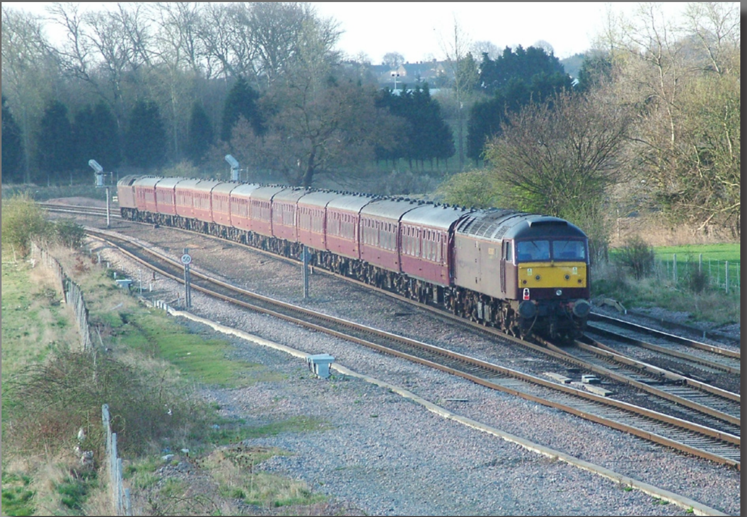
Above: Class 47 767 on the rear of the 1222 Sheffield - Canterbury, Canterbury Tales Railtour, 47 804 was leading, passes Harrowden Jct on the 5th April.