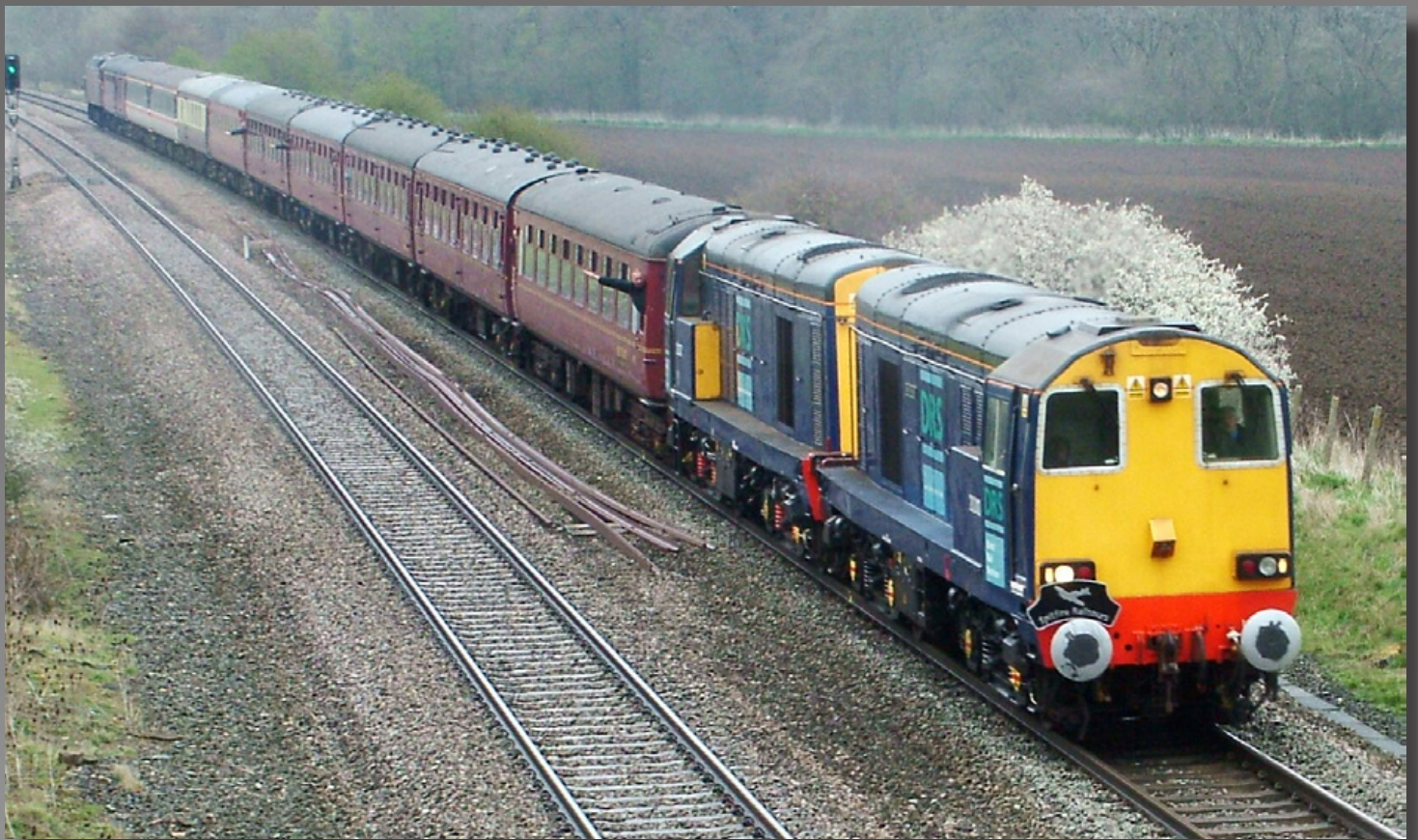
Above: Class 20 310 "Gresty Bridge" and 20 307 on 1Z30 Spitfire Railtours "Wey-Farer" from Crewe - Weymouth past Shrivensham in appalling weather on Saturday 19th April.