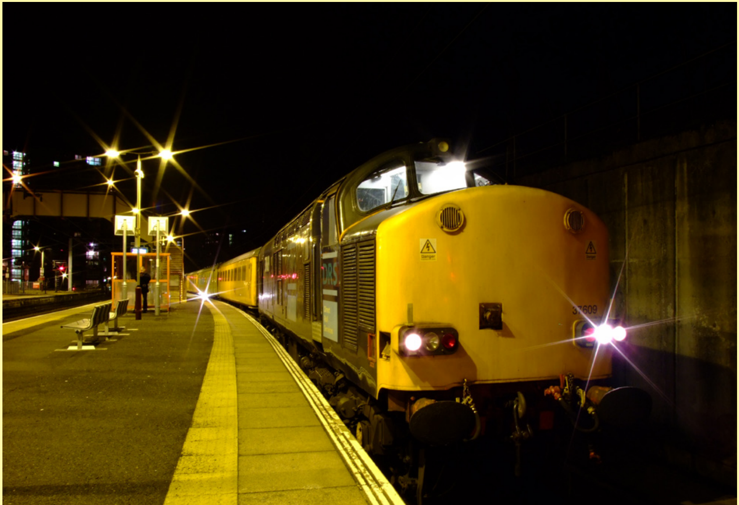
Above: Class 37 609 and with 37 069 at the rear, are seen standing at Dalmuir station about to head back to Polmadie to be stabled for the night having worked an Ultrasonic Test Train from Polmadie - Polmadie via Helensburgh, Milngavie and Drumgelloch on the 9th April. Jonathan McGurk