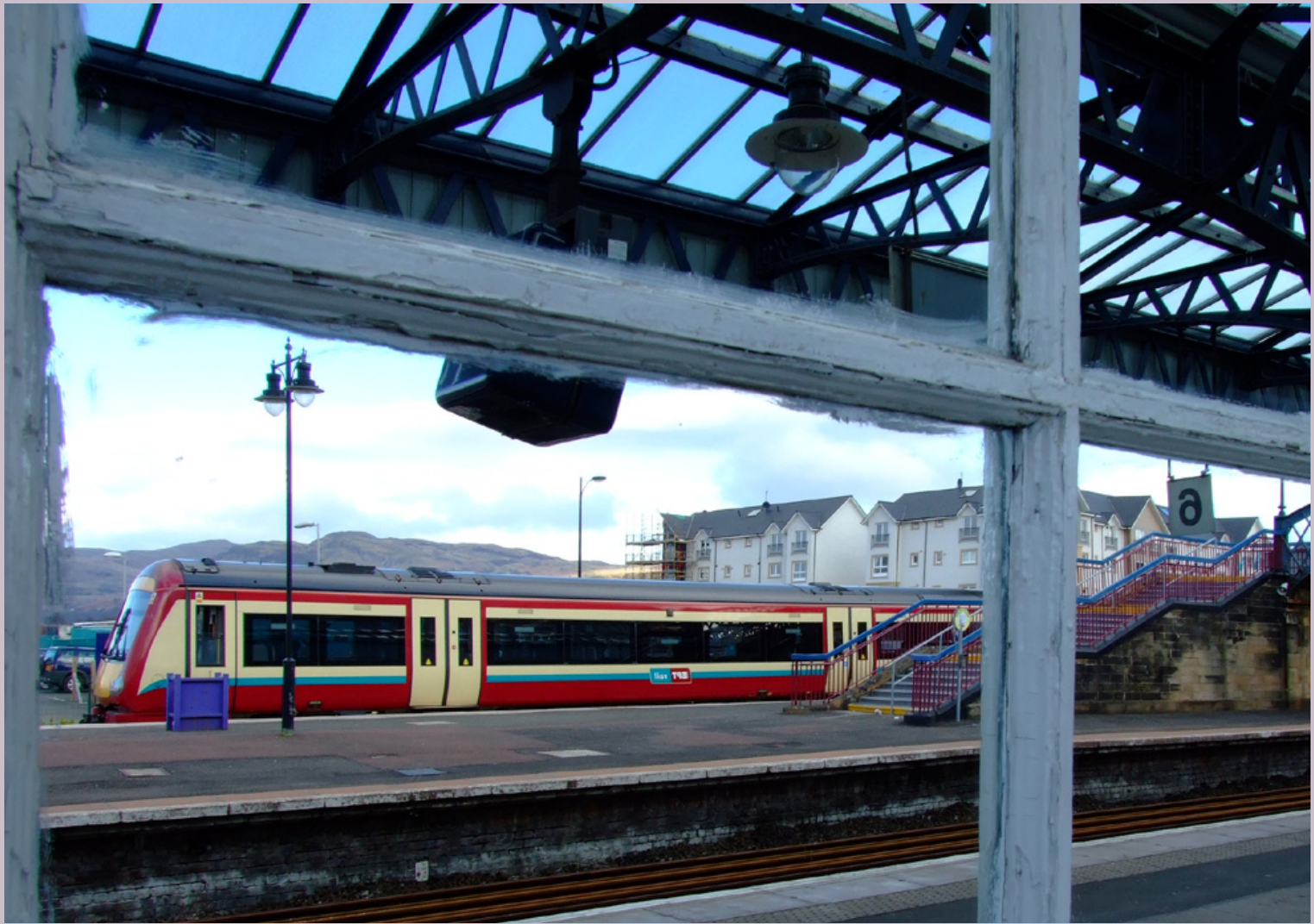
Above: "Through the square window." It's early morning, as Class 170 478 is seen reflecting off of the station windows at Stirling station.