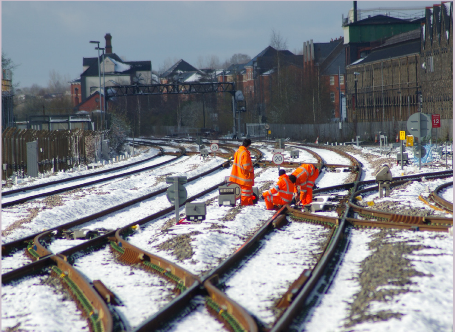
Above: Just after the snow at Swindon on 6th April, these hardy lads were fixing a point problem. Nigel Chalk