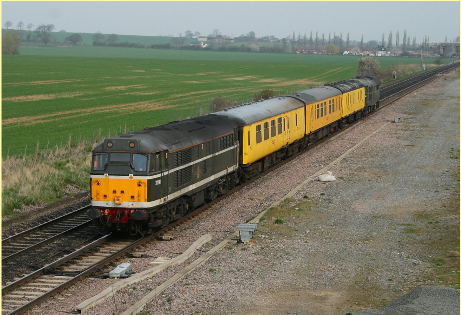
Above: A pair of Class 31s pass Harrowden Junction on the 22nd April 2008. 31190 in BR green T&T with 31459 in Black working a Serco Test train, running as 4Q10 Derby RTC to Selhurst.