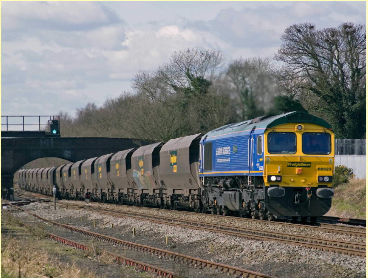
Above: Blue liveried Class 66 623 works the 6Z82 Portbury-Rugeley passed Cosford on the 19th.