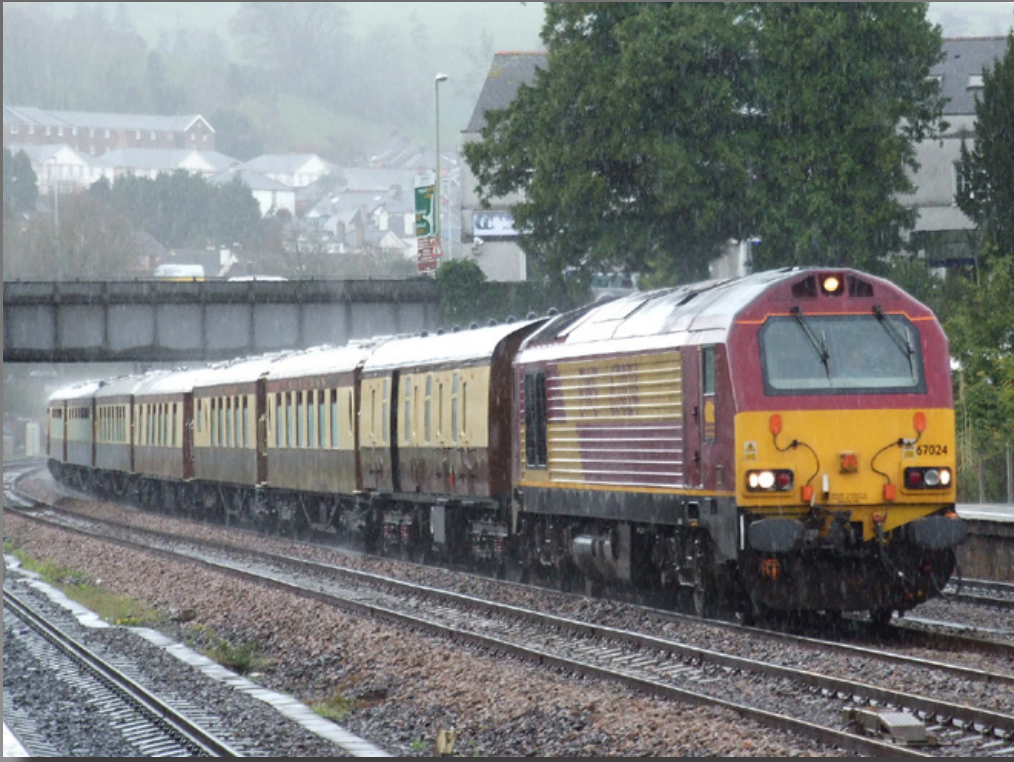
Left: The delayed Truro - Taunton VSOE thunders through a very wet Totnes on the 12th April. Liam