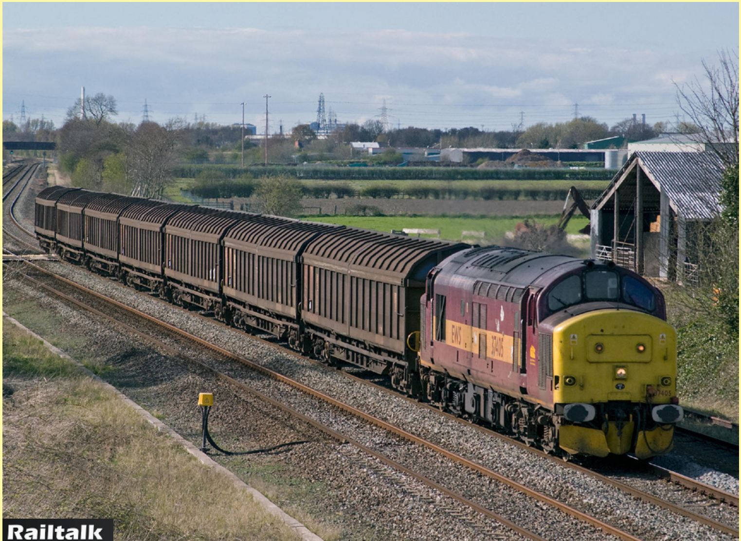
Below: Class 37 405 works the 6F15 Holyhead - Sandycroft on the 12th April. Carl Grocott