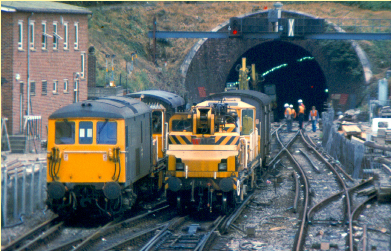
Above: . Recently it has been announced that in order to accommodate larger container trains, various bridges and tunnels will have to be widened. In 1984, Southampton Tunnel was re-lined and the damp-course removed which caused approx. 6 weeks of disruption. The current plans for the infrastructure work on the bridges and tunnels from Southampton Container Port to the Midlands could take years! Here an archive shot of the western portal of Southampton Tunnel on 8th September 1984 during the engineering work. The track bed will have to be lowered through the tunnel in order to accommodate the new size containers which will obviously require several days of closure!. David Mead