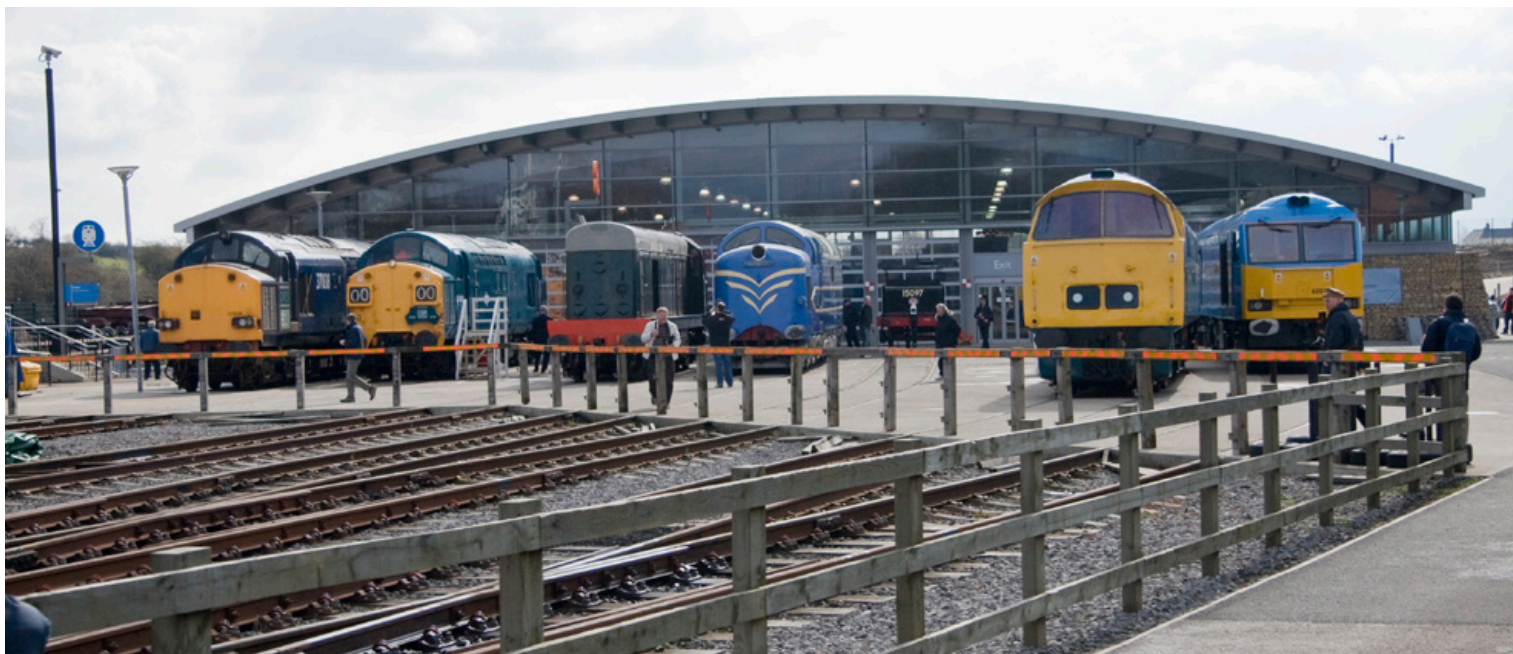
The NRM at Shildon had a bit of a gala in April.

Above: There can't be many times a line up like this will happen, Deltic, Pioneer Class 20 D8000, Western D1023, Class 37 003 along with mainline Class 37 038 and Class 60 074.