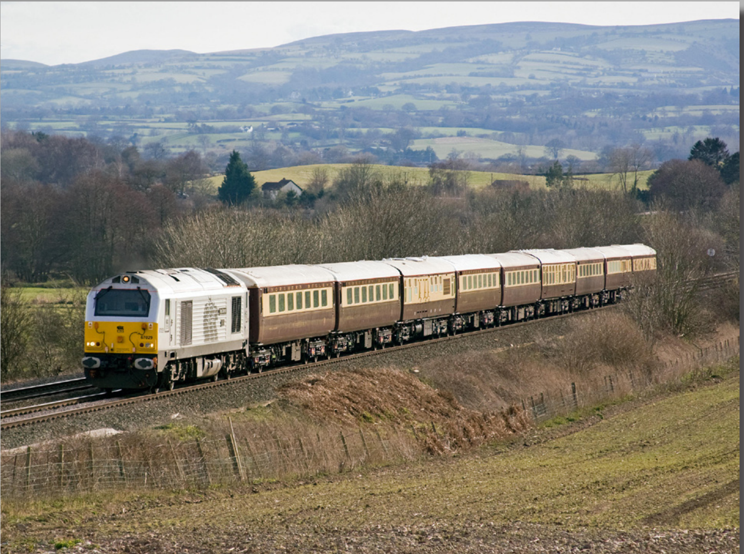
Below: Class 67 029 works the 5Z60 Cardiff - Crewe passed Condover. Carl Grocott