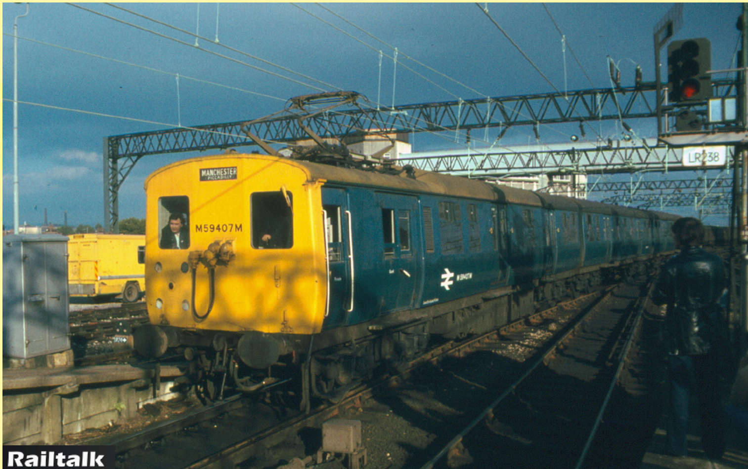
Below: In 1978 there were no Class 323's, this is Hadfield Electric - M59407M arriving at Manchester Piccadilly. One of the 3-car Open Sets operated on 1500 Volts D.C. !