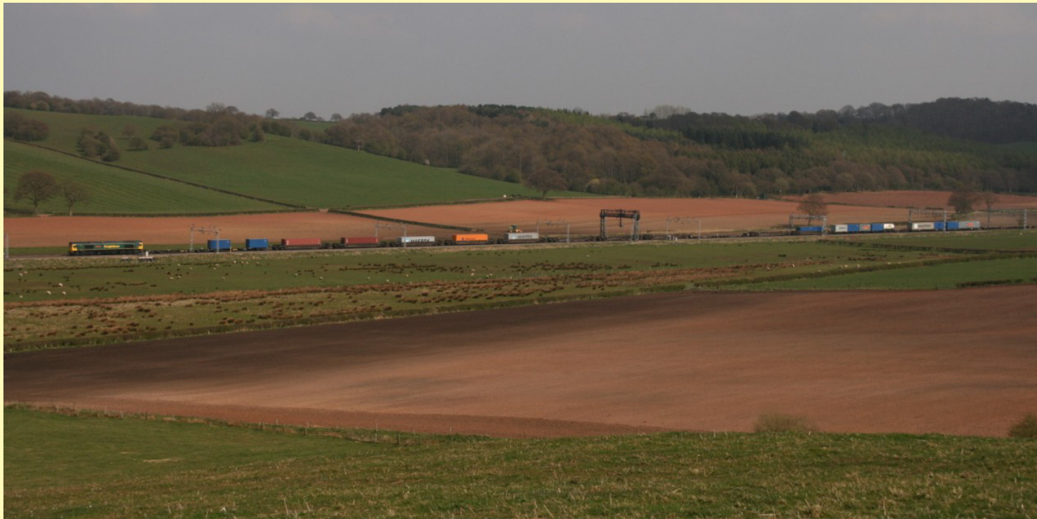
Top: Class 66 534 passes the delightful setting of Baldwins Gate on the 22nd April. Brian Battersby