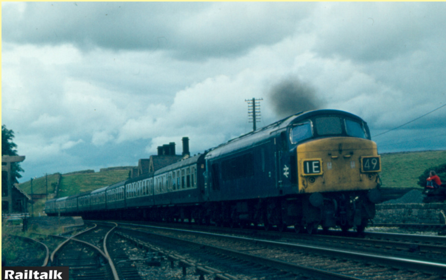
Below: Class 45, D22 on 09.40 (SO) Glasgow Central - Leeds City passing Kirkby Stephen West on 4 Aug 1973.