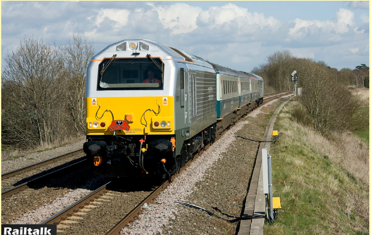
Below: With the commencement of services from Wrexham to London Marylebone, these silver Class 67's are set to become a regular feature along the route. This is a shot of a training run, shortly before commencement of a full service at the end of April.