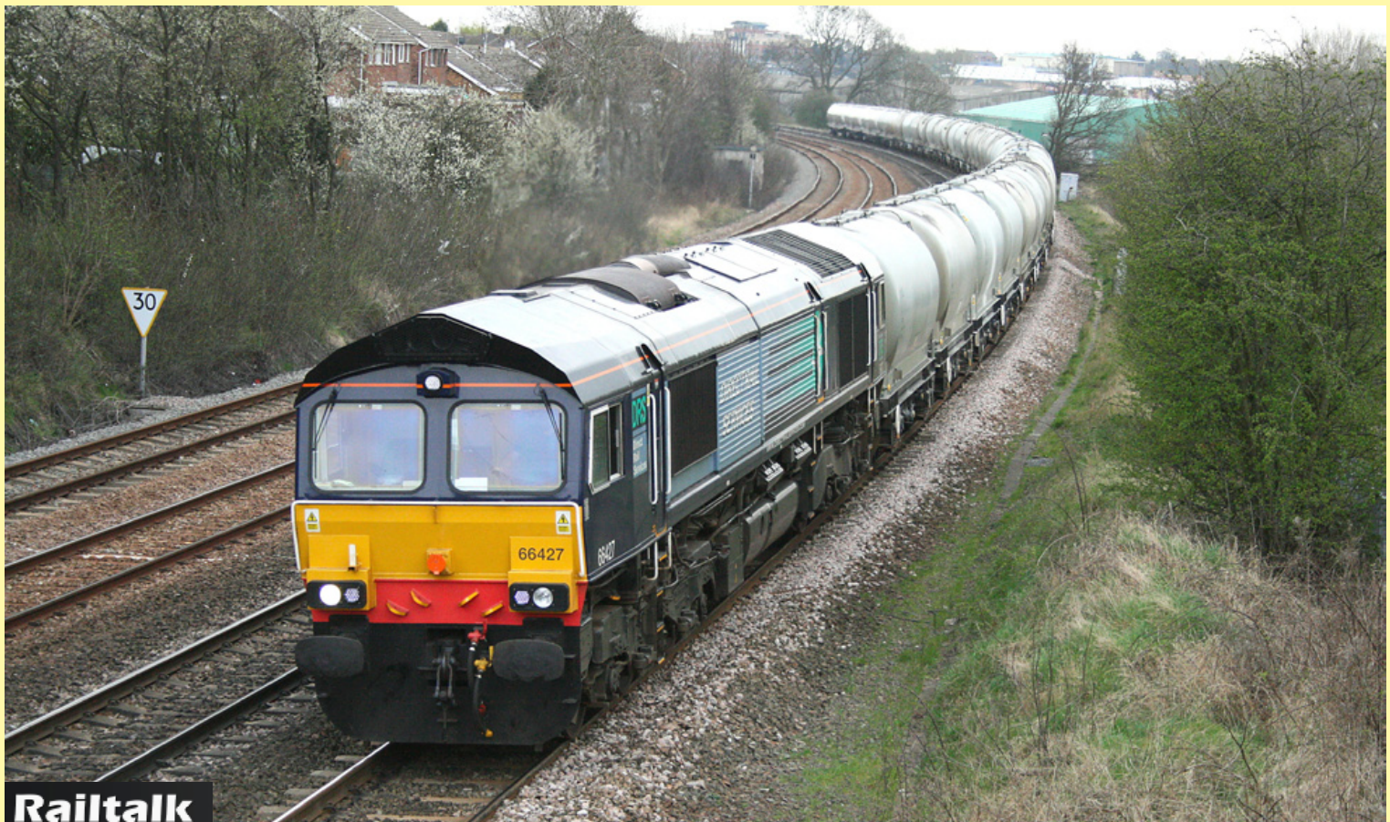
Below: This is Headlands Bridge, Kettering on the 4th April, and Class 66 427 on loan to Freightliner, works 6M91 Theale - Earles empties.