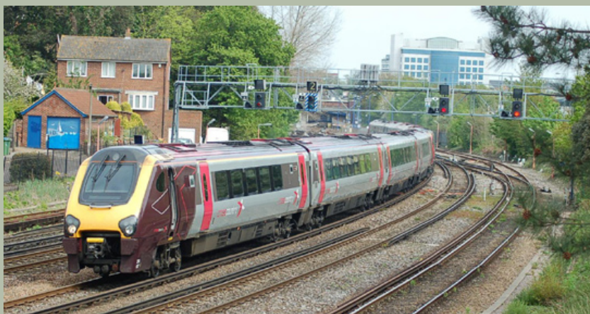
Left: A Cross Country liveried Voyager passing a footbridge 5 mins walk, South of Southampton Central Station.