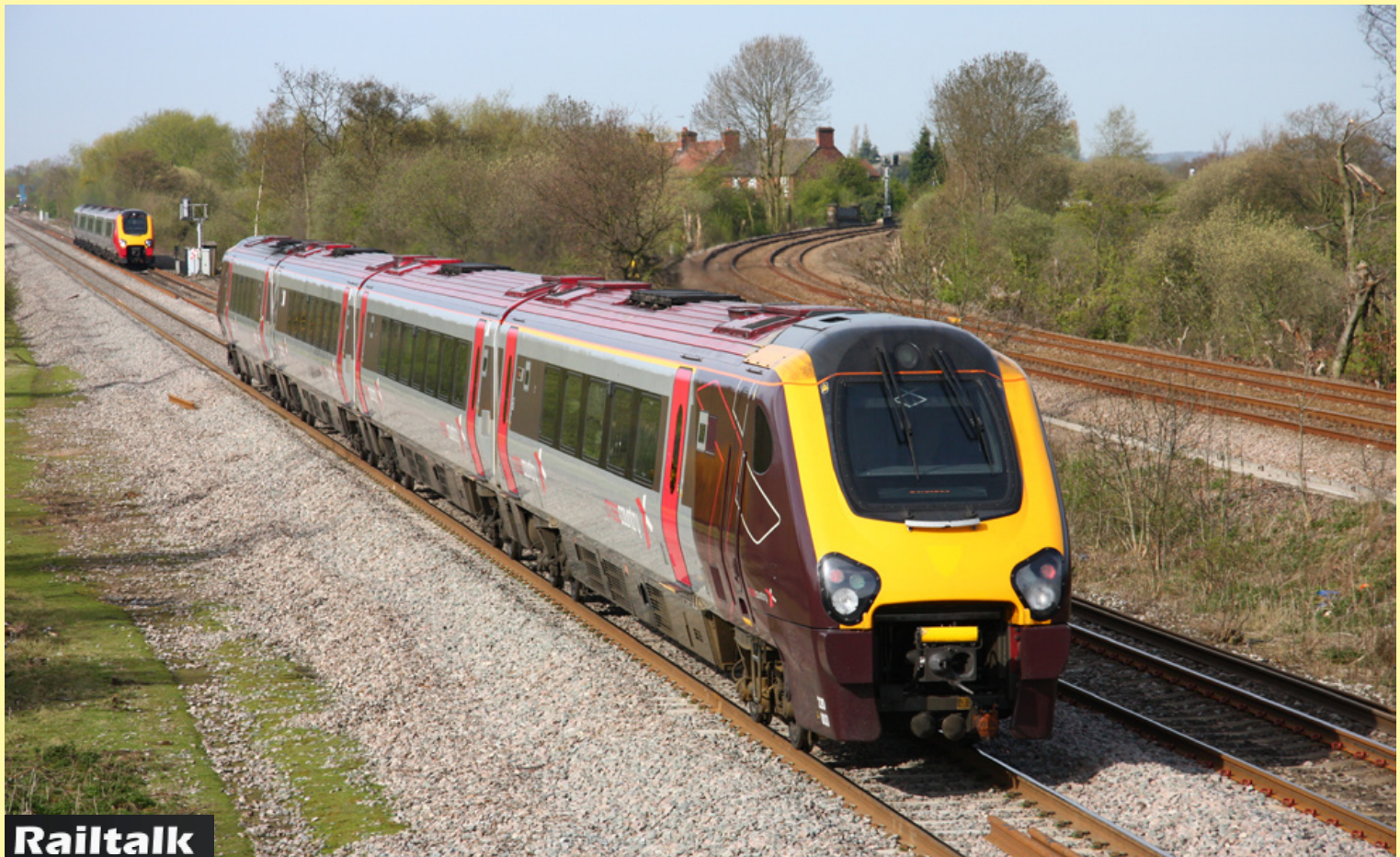
Below: This shot is taken at North Staffs. Junction on 26th April. New liveried Voyager 220 003 passes old liveried Super Voyager 221 129. 220 003 was working a York to Paignton service and 221 129 a Birmingham New St. to Newcastle service.