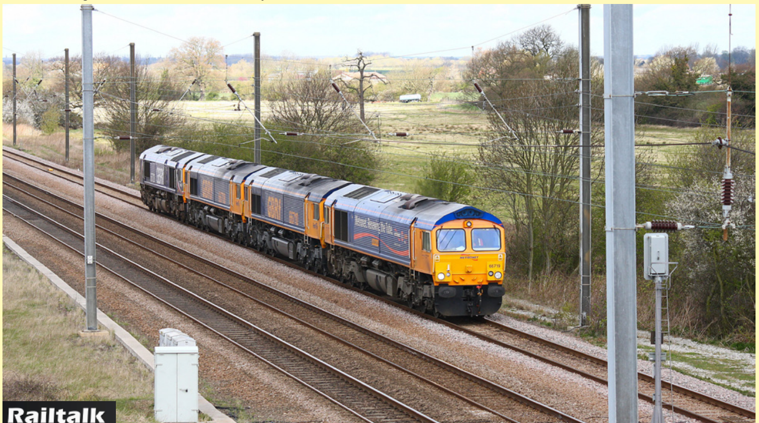
Below: Seen passing Marholm on the 12th April, Class 66 719 'Metro-Land' leads 66 710, 66 708 and 66 723 with 0H78 Selby to Peterborough Yards. 66 719 and 66 710 then ran light to Whitemoor Yard later in the day. Steve Madden