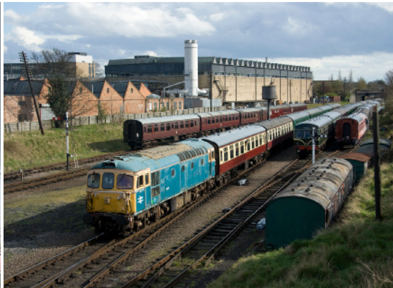
A selection of shots from the Great Central's Diesel Gala, held in April. Many thanks to all who have sent in Photos from this and all the Gala's this month.