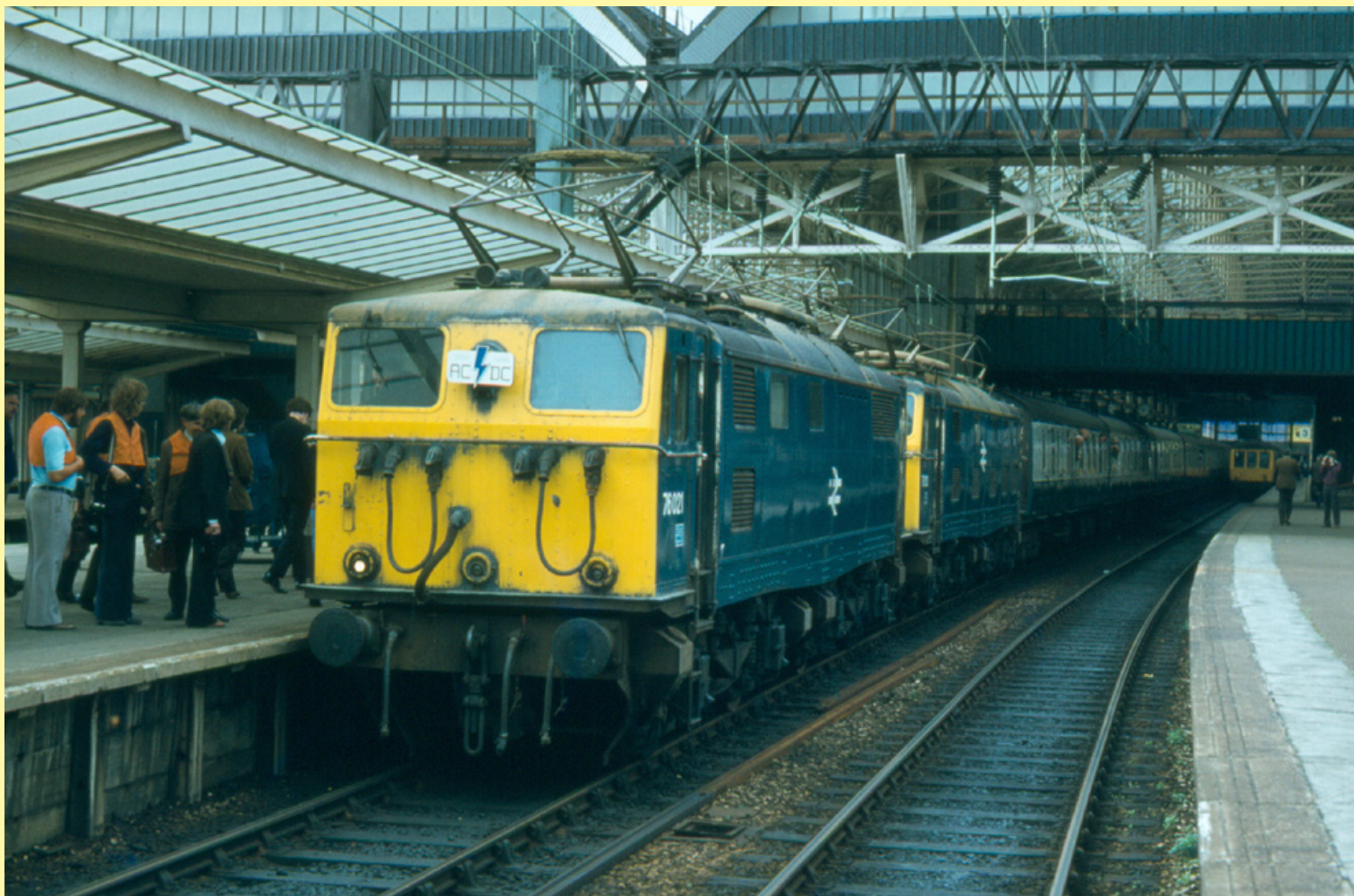
Above: Class 76 021 and 76 013 at Manchester Piccadilly. This was quite an occasion, as the through passenger trains had been withdrawn as long ago as 1970 but 25kv trains remained on the line as freights but of course rarely did the EMI's come into Manchester Piccadilly station after 1970. This photo was taken on Saturday 16th September 1978, nearly 30 years ago.