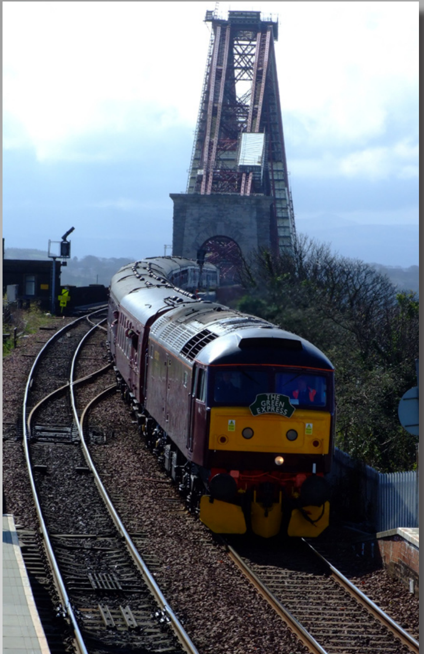
Right and Below: Two shots of Class 47 760 and Class 47 787 passing through North Queensferry station while heading towards Dundee working the 05.27 1Z48 Skipton - Dundee 'The Green Express' charter train on the 19th April.