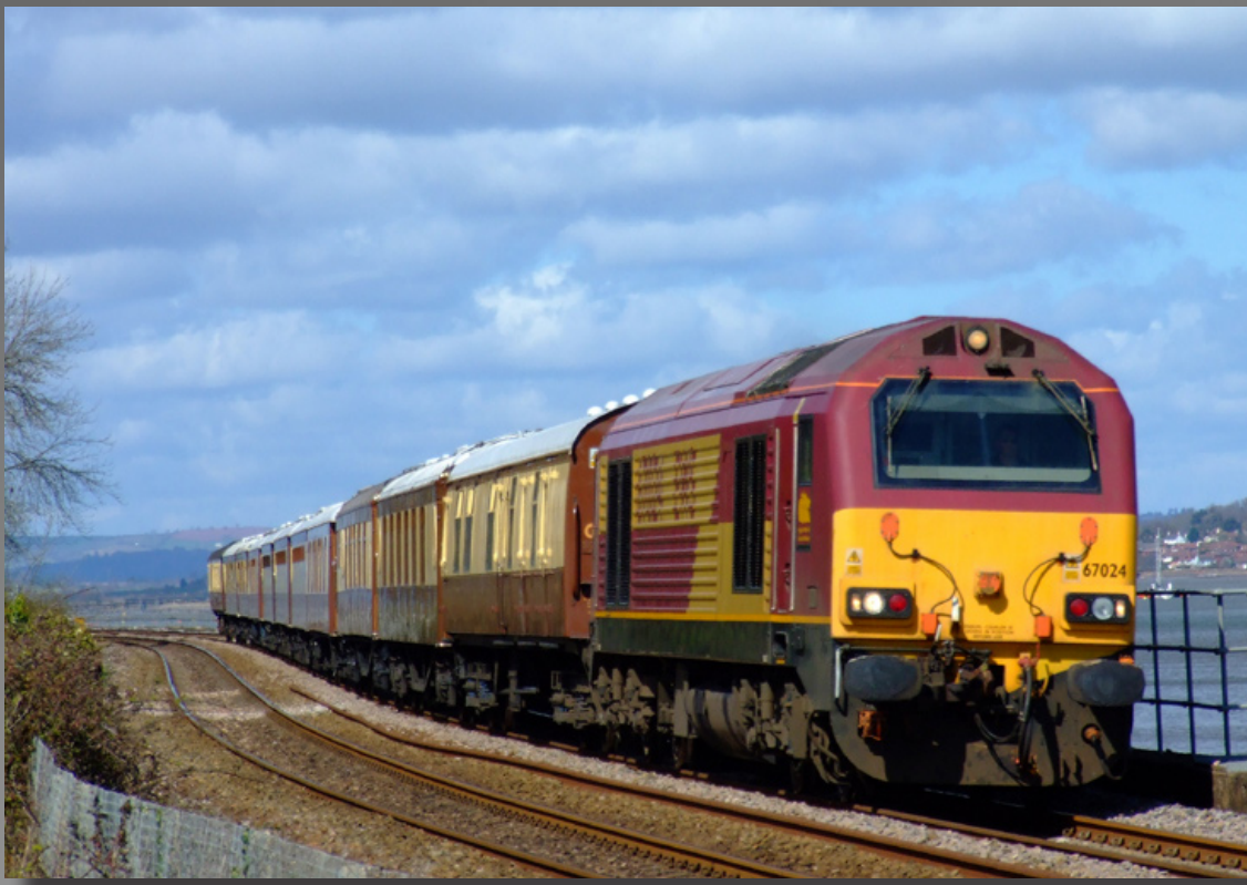
Left: Class 67 024 leads 1Z67 0951 Victoria - Truro VSOE past Starcross on the 11th April. Liam