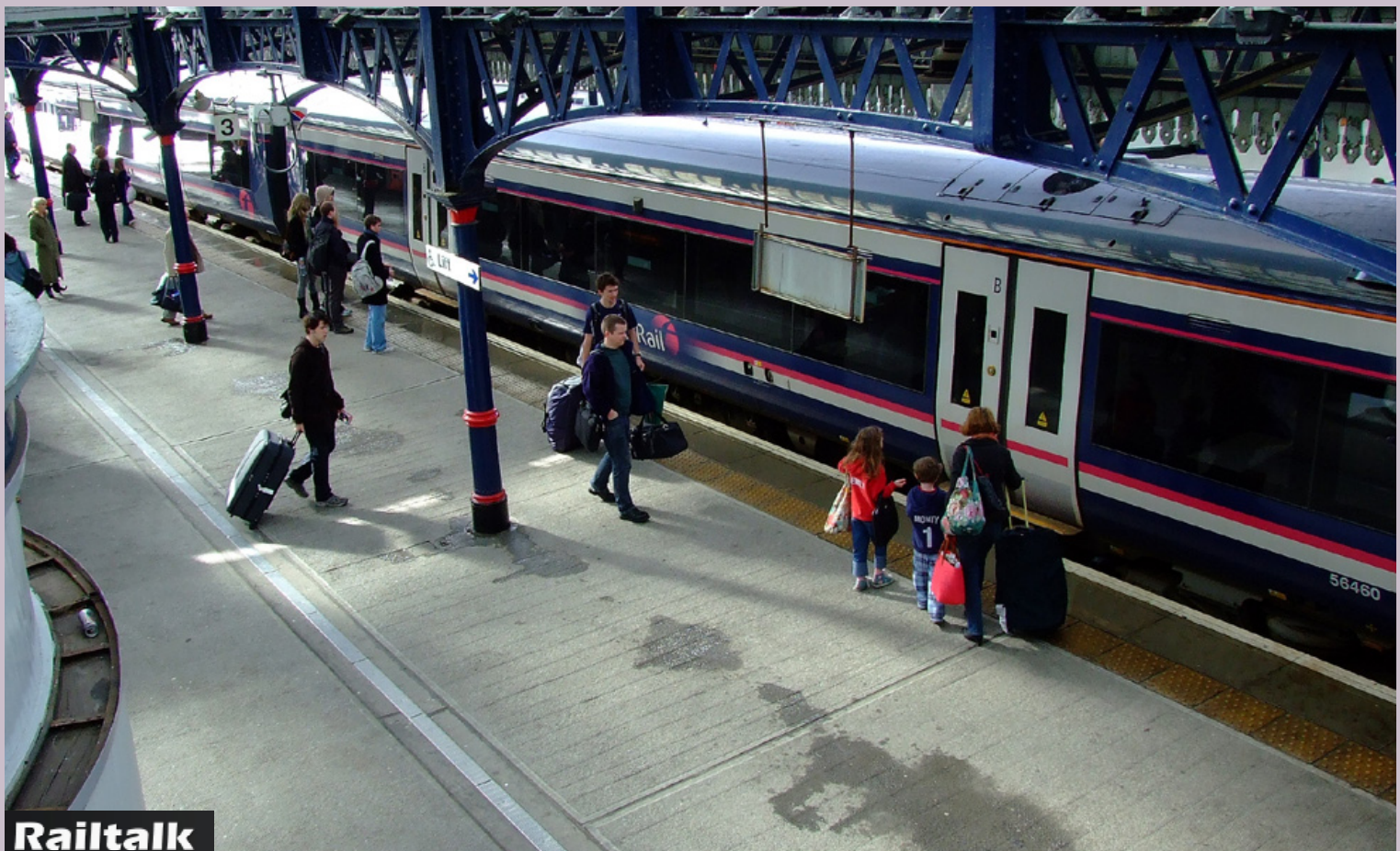
Below: A view of commuters at platform 3 of Stirling station about to board Class 170 460 which has just arrived into the station on the 1st April.