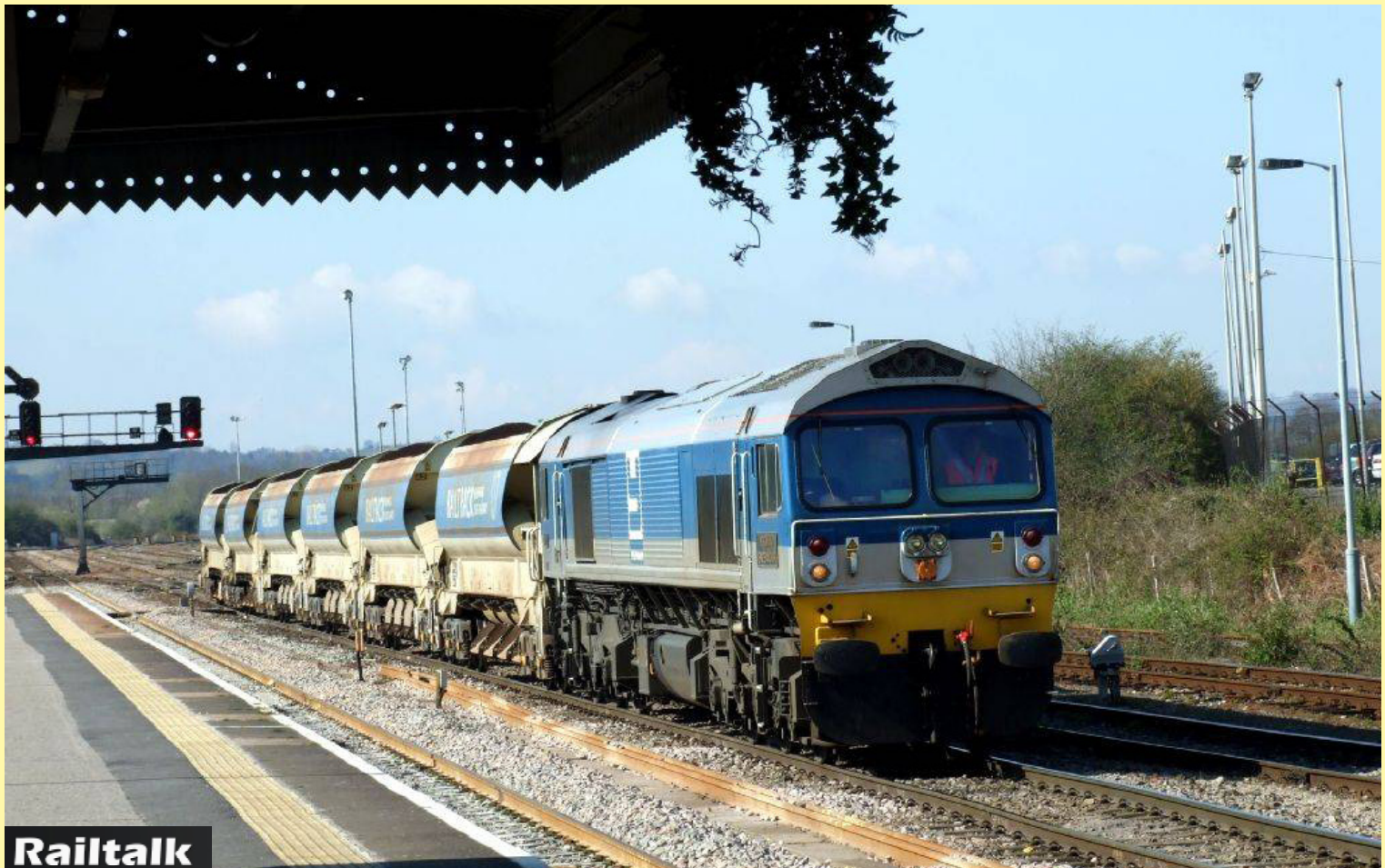
Below: Always looking smart are the Class 59's. This is "Yeoman Endeavour" shunting at Westbury on the 13th April. Jim