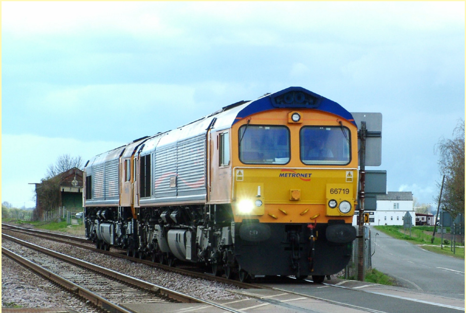
Above: Class 66 719 "Metro-land" leads 66 710 across the road at Three Horseshoes with a Peterborough - March light engine move. Derek Elston