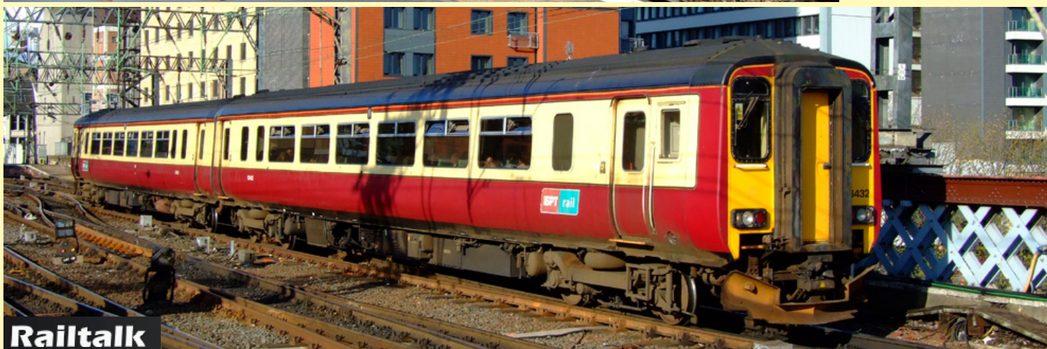
Below: Class 156 432 is seen departing Glasgow Central High Level station working the 17.37 2A96 Glasgow Central High Level - Barrhead service on the same day. Jonathan McGurk