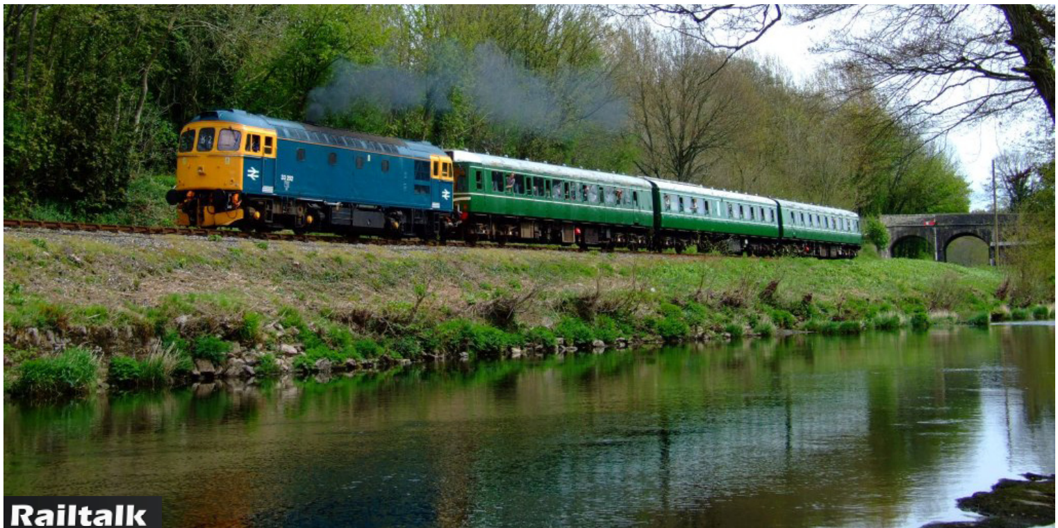
Below: One week later and on the 26th April the South Devon Railway had it's Diesel Gala. Advenza's Class 33 202 powers up near Hood Bridge with a delayed service for Buckfastleigh. Liam