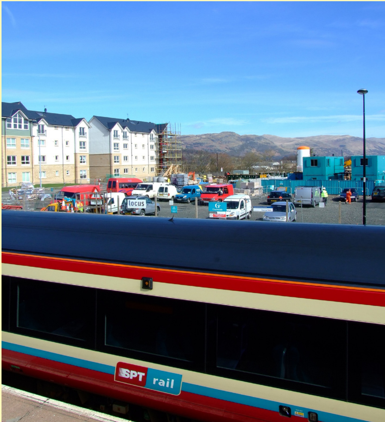
Above: A side view of Class 170 474, taken from the footbridge at Stirling station. The train worked the 12.19 2N69 Glasgow Queen Street High Level - Stirling service. The new flats in the background are slowly being built which will mean more commuters for the station and business for SPT and First ScotRail. This photograph was taken on Wednesday 2nd April. Jonathan McGurk