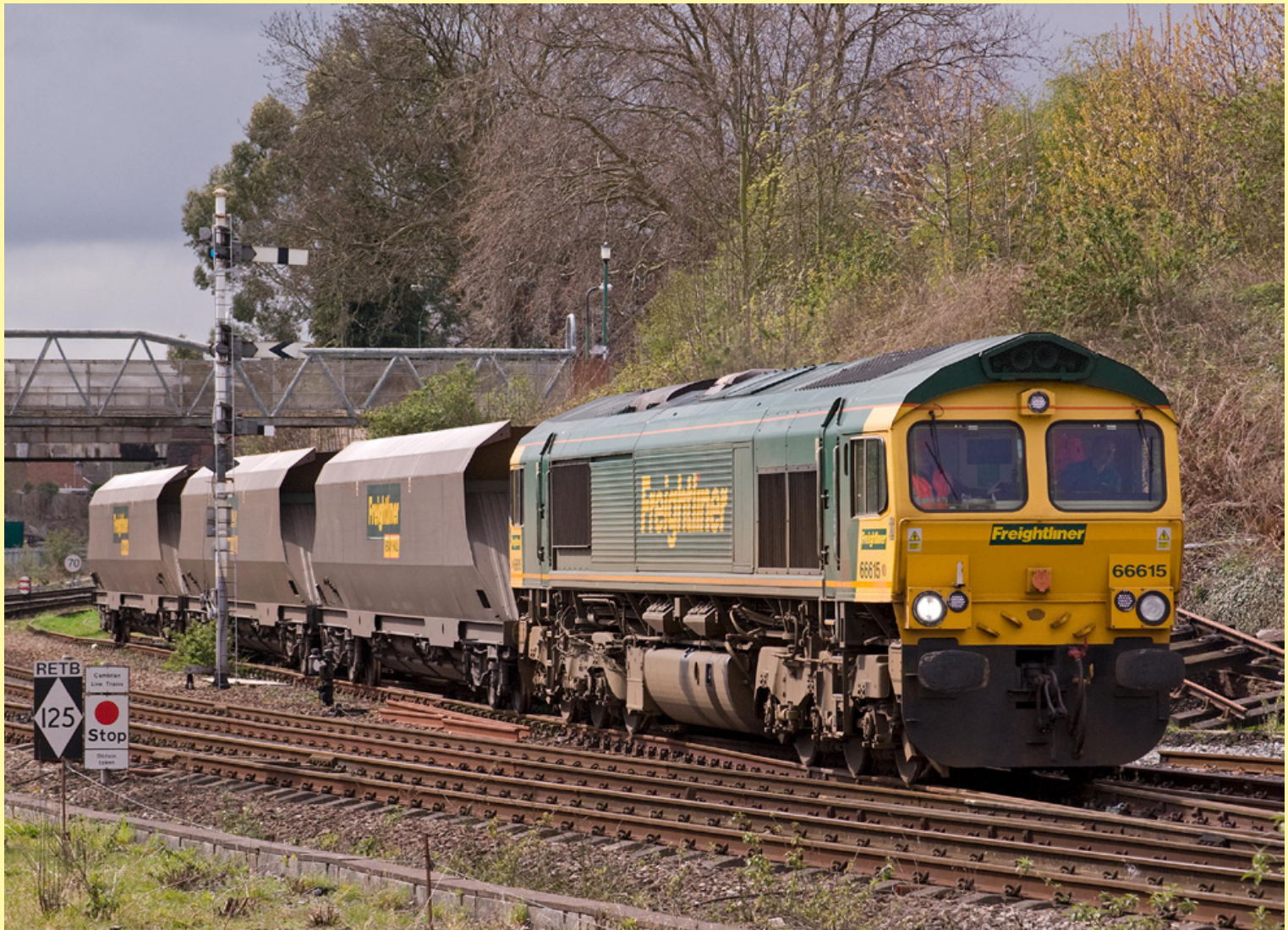
Above: Class 66 615 works the 8Z50 Sutton Bridge - Shrewsbury Coal Yard special working on the 13th April. This shot is of the train leaving Sutton Bridge, just as the sun starts to appear from a very dark and threatening sky.