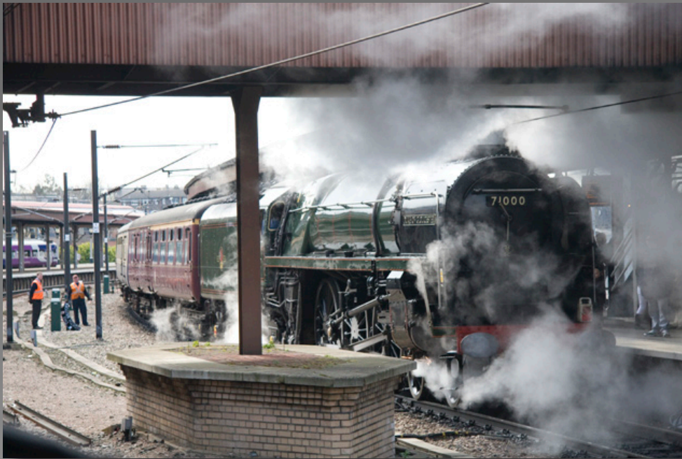
Left: 71000 "Duke of Gloucester" working the North Briton tour is seen at York on 12th April.