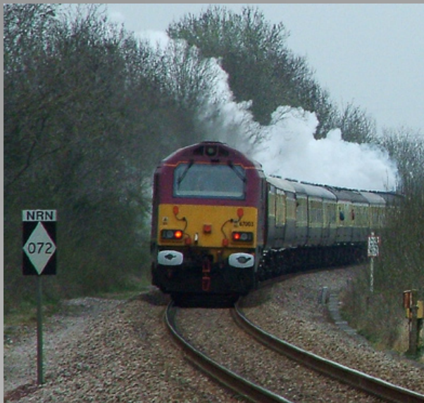
Left: Class 67 003 on the rear of the Severn Valley Phoenix heads past Mintey heading for Kemble, also on Saturday 19th April.