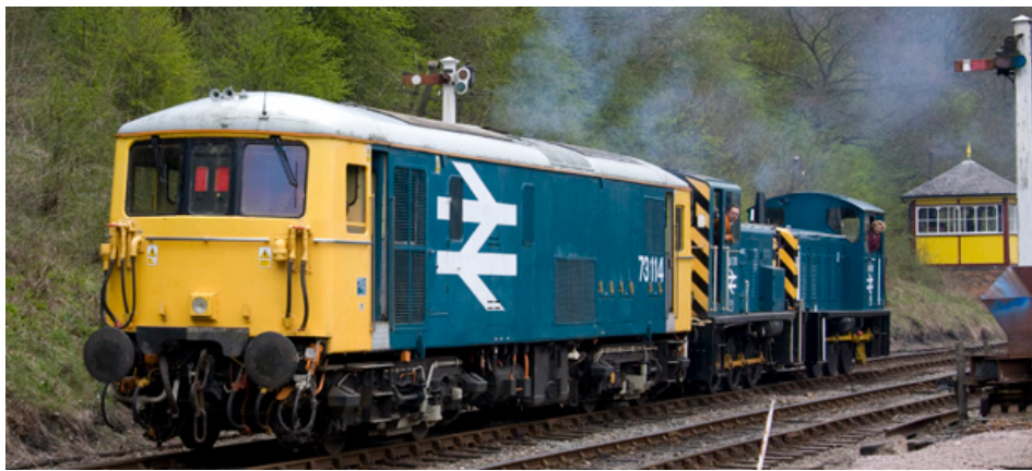
Middle: Triple power for the Battlefield Line Gala in the shape of Class 73 114, 04 110 and 03 170. The shunters were worked hard during the day. Andy