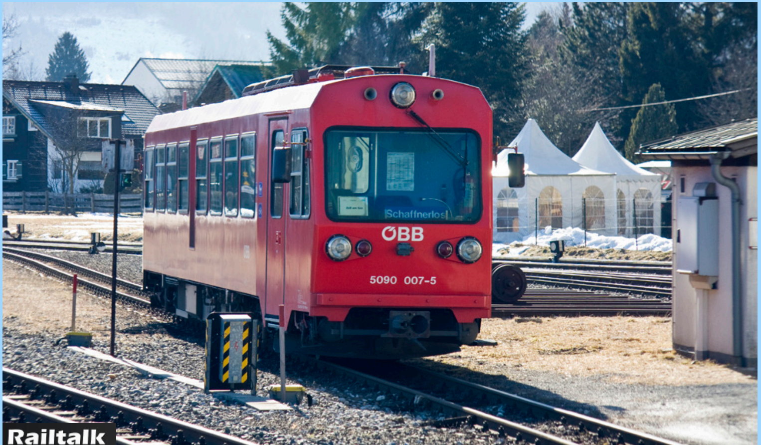
Below: Zell am See sees both mainline rail services and also has a narrow gauge railway. This is OBB 5090 Class, seen at the small depot a short walk from the main station and well worth a visit. Andy