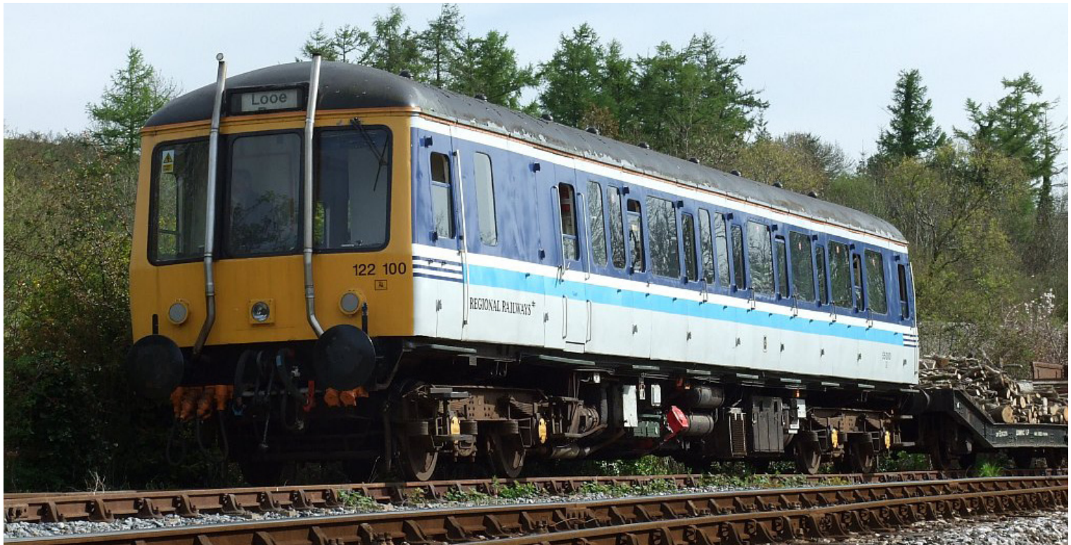
Above: Also in action at the South Devon Railway's Diesel Gala in April was their Bubble Car seen here at Dock Siding, Staverton.