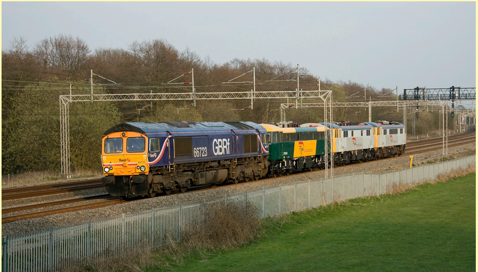
Above: Was this the biggest news of the month??. Class 66 723 hauls Class 87's 87 026 87 008 and 87 007 from Long Marston to Crewe for electrical testing prior to dispatch to Bulgaria. This is the convoy on the West Coast Mail Line on the 22nd April. Note only 87 026 carries the full livery.