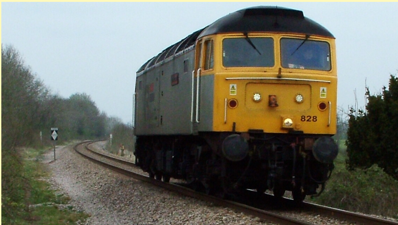
Above: Class 47 828 "Joe Strummer" running as 0P01 Gloucester - Norwich is seen approaching Minety Crossing on Sat 19th April.