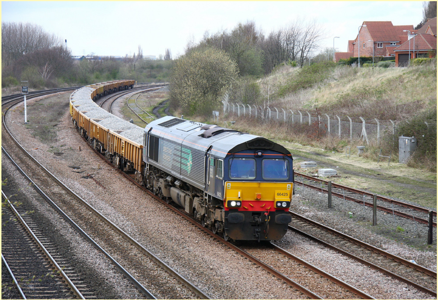
Above: Another DRS Class 66 on loan to Freightliner during April was 66 425 seen here at Kettering South working 6A10 Stud Farm to Forders stone train on the 10th April.