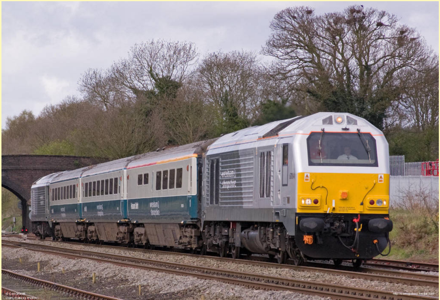
Above: We've had plenty of pics in this month from these "new kids on the block". Wrexham and Shropshire have started running a full service in April, using Class 67's and hired-in stock until their's is ready. This is Class 67 014 and 67 012 working 1P13 Wrexham - Marylebone. Carl Grocott