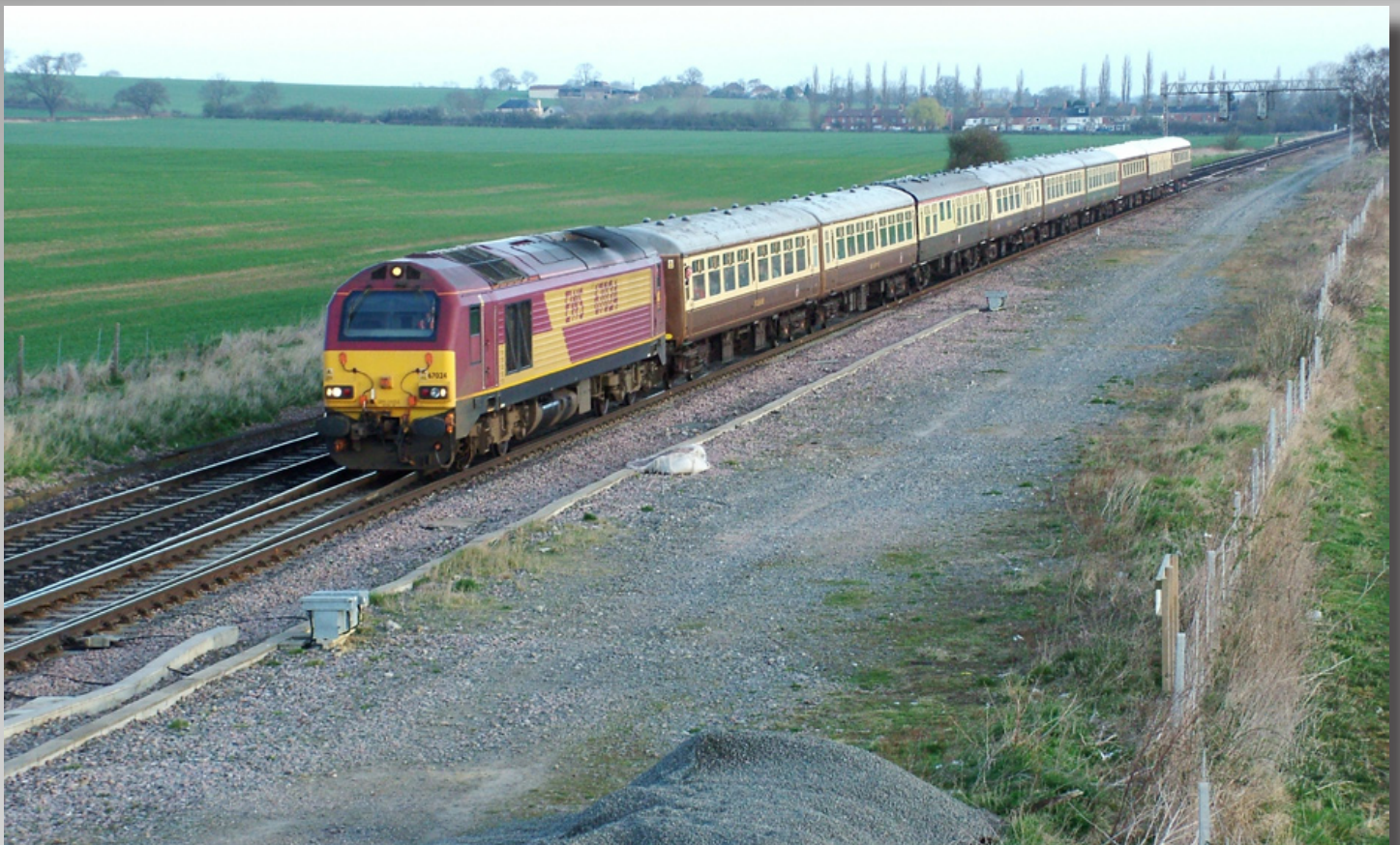
Below: Class 67 024 approaches Harrowden Junction with Kingfisher Railtours, Derby - Folkestone "Golden Arrow" as far as Willesden where it will hand over to 34067 Tangmere. Derek Elston