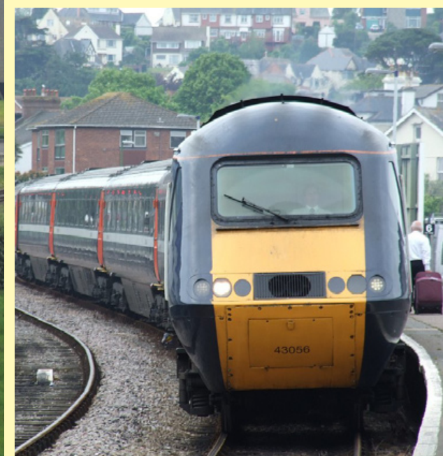
Below: Summer's here, Cross Country have commenced hire-in HST sets for the additional diagrams, Nat-Ex's 43056 is seen departing Paignton on the 24th May. Liam