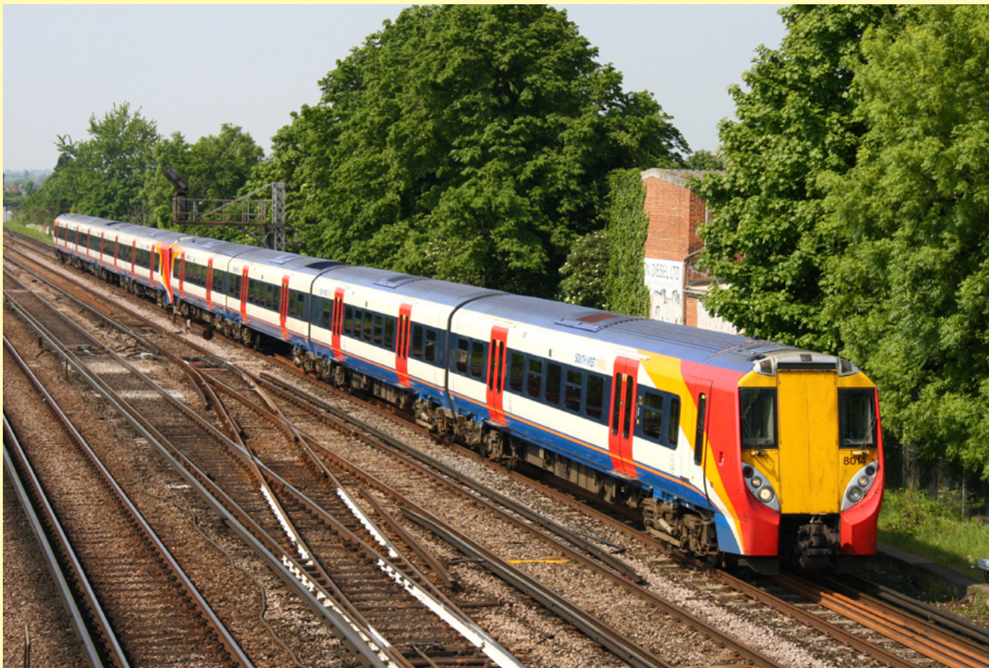
Above: Junipers 8014 and 8016 approaching Wimbledon en route to Wimbledon Park Depot for tyre turning, on the 22nd May.