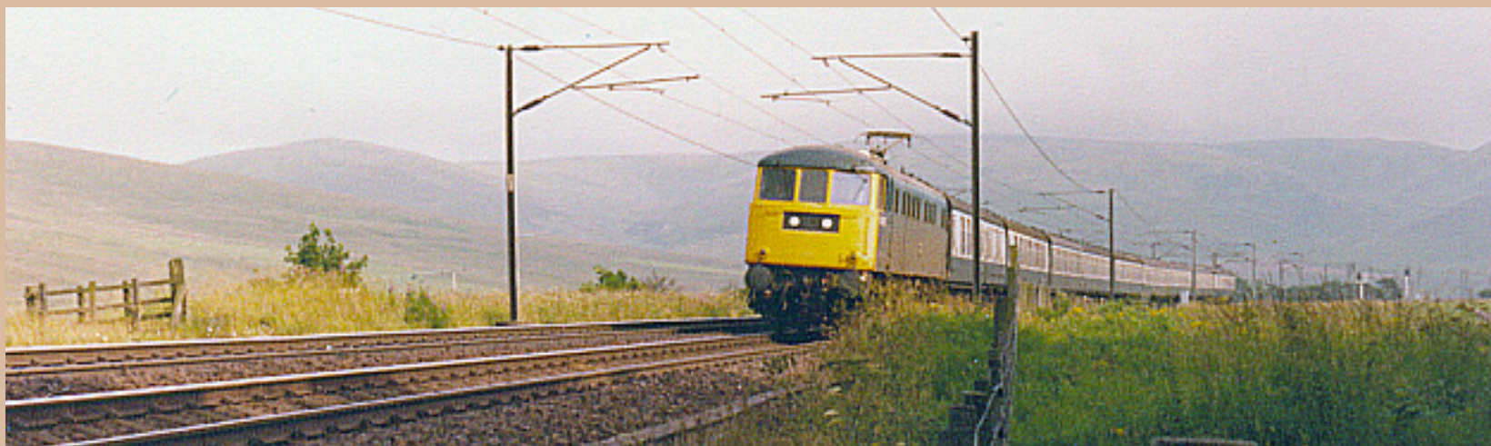
Right: An unidentified Class 81 approaches Crawford on the 8th August 1981.