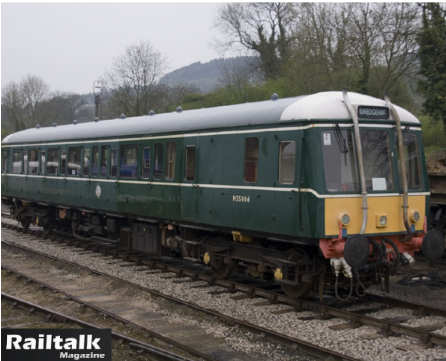
Top Left: A Class 100 DMU awaits restoration at Swanwick, Midland Railway Centre.