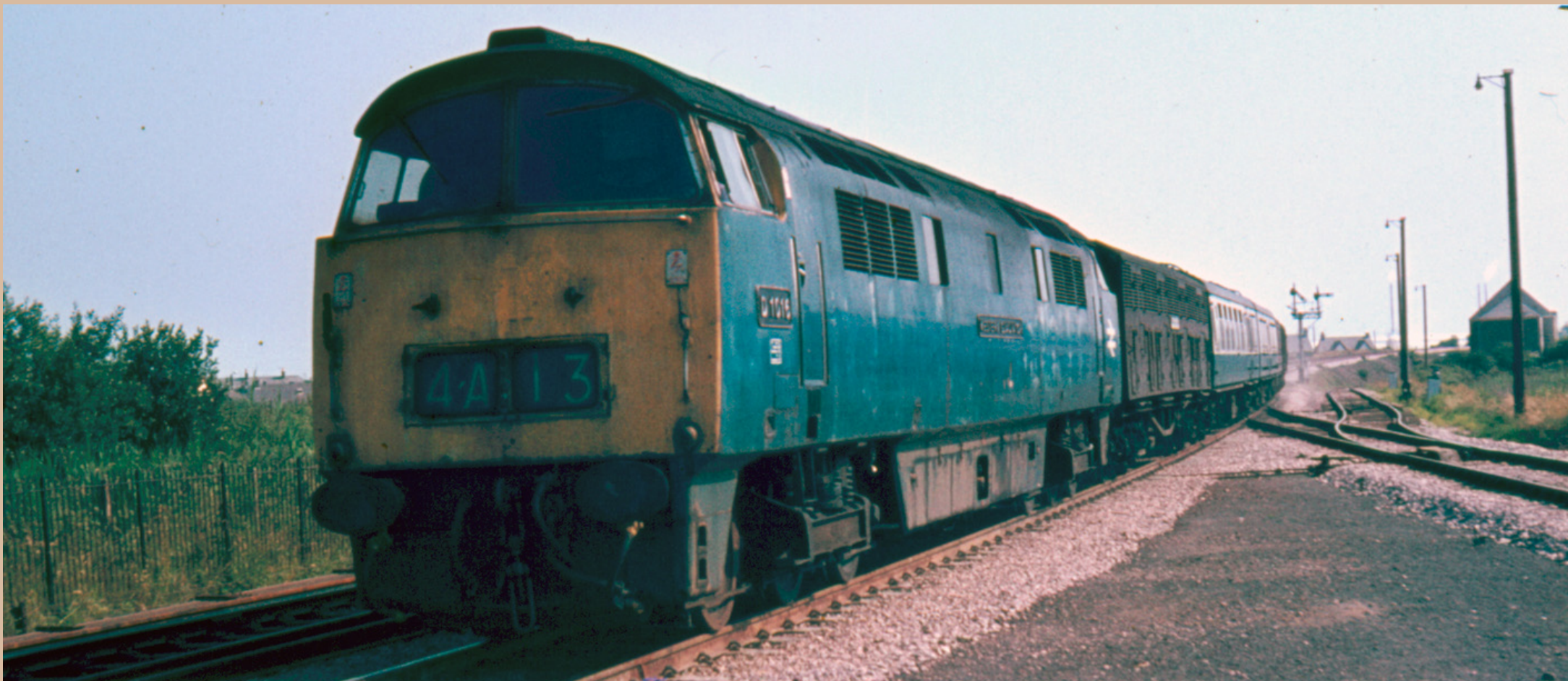
Above: On the 2nd July 1975, Class 52 D1016 "Western Gladiator" approaches Par on a Parcels Train.