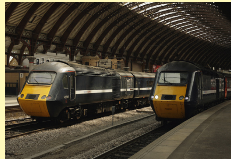
Top Right: In the shadows at York, HST's 43296 and 43095 pass on the 24th May.