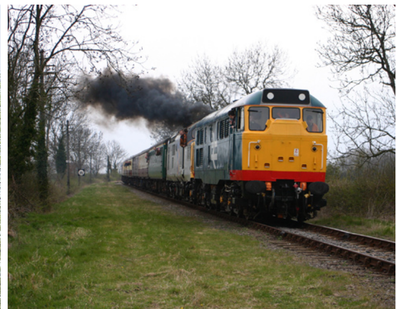
Left: Class 52 D1013 leaves Bridgenorth with a service to Kidderminster on the 11th May. Above: Class 31 and Class 37 super power at the Battlefield Line. Below: Visiting N7 69621 works upgrade toward Tenterden Town on Sunday 4th May