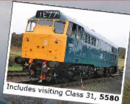
Includes visiting Class 31, 5580