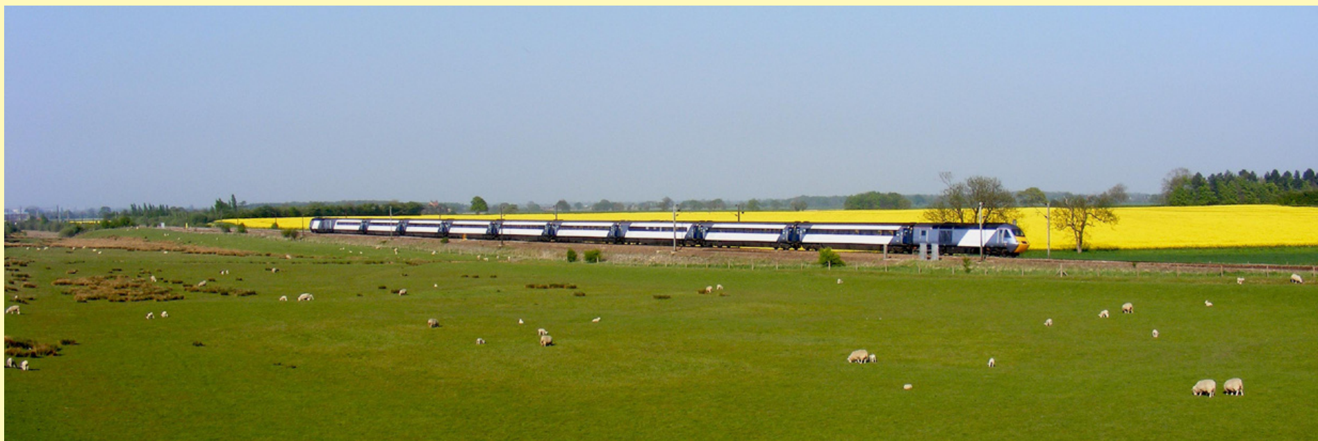
Right: An unidentified National Express HST passes Colton Jct. on the 8th May.