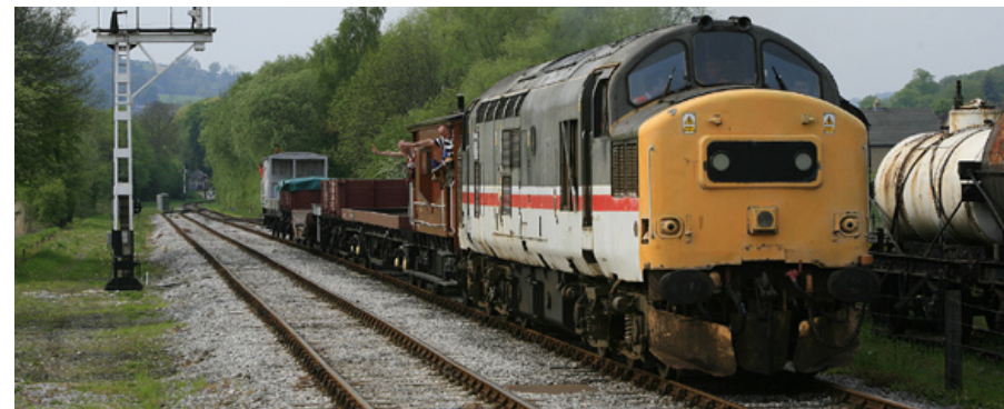
Right: Still wearing it's Inter-City livery is Class 37 152, complete with enthusiastic passengers, and animals..... Jon Jebb