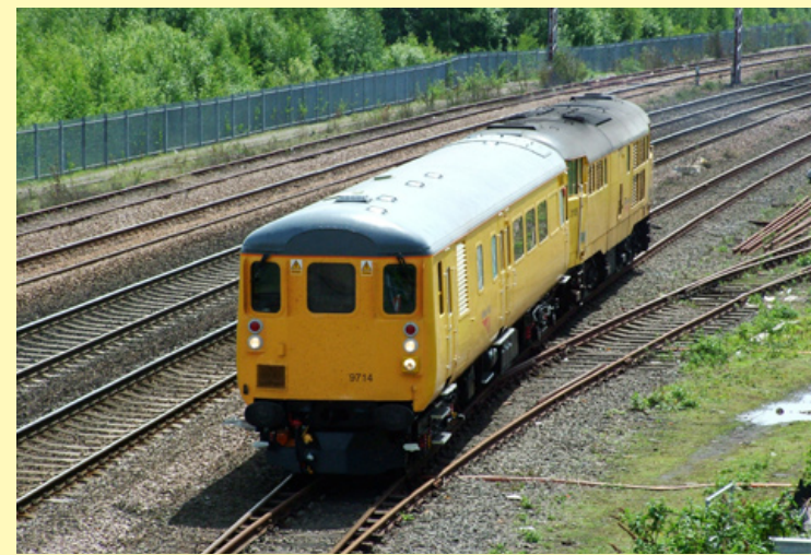
Middle Right: Class 31 105 propells DVT 9714 at Wellingborough working 5Z47 Selhurst - Derby RTC on the 29th May.