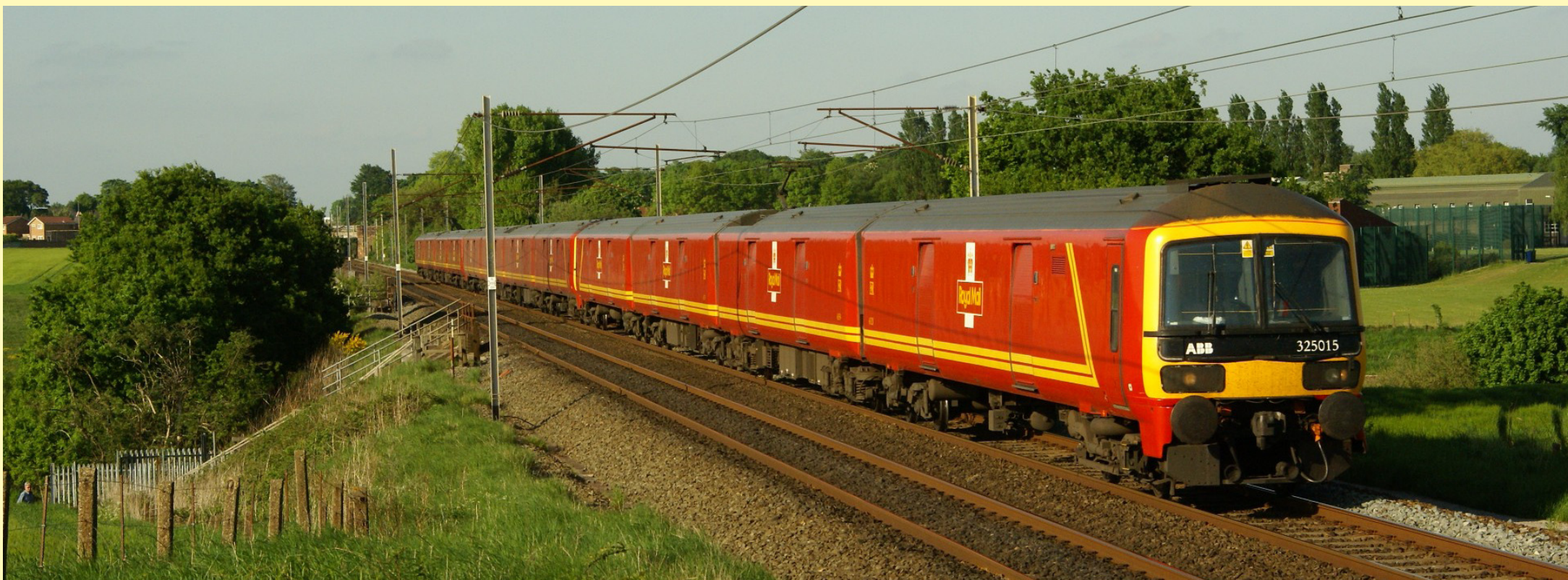
Above: Class 325 015 Royal Mail postal unit working a Sheldmuir - Willesden PRDC service at Redbank on the 14th May.