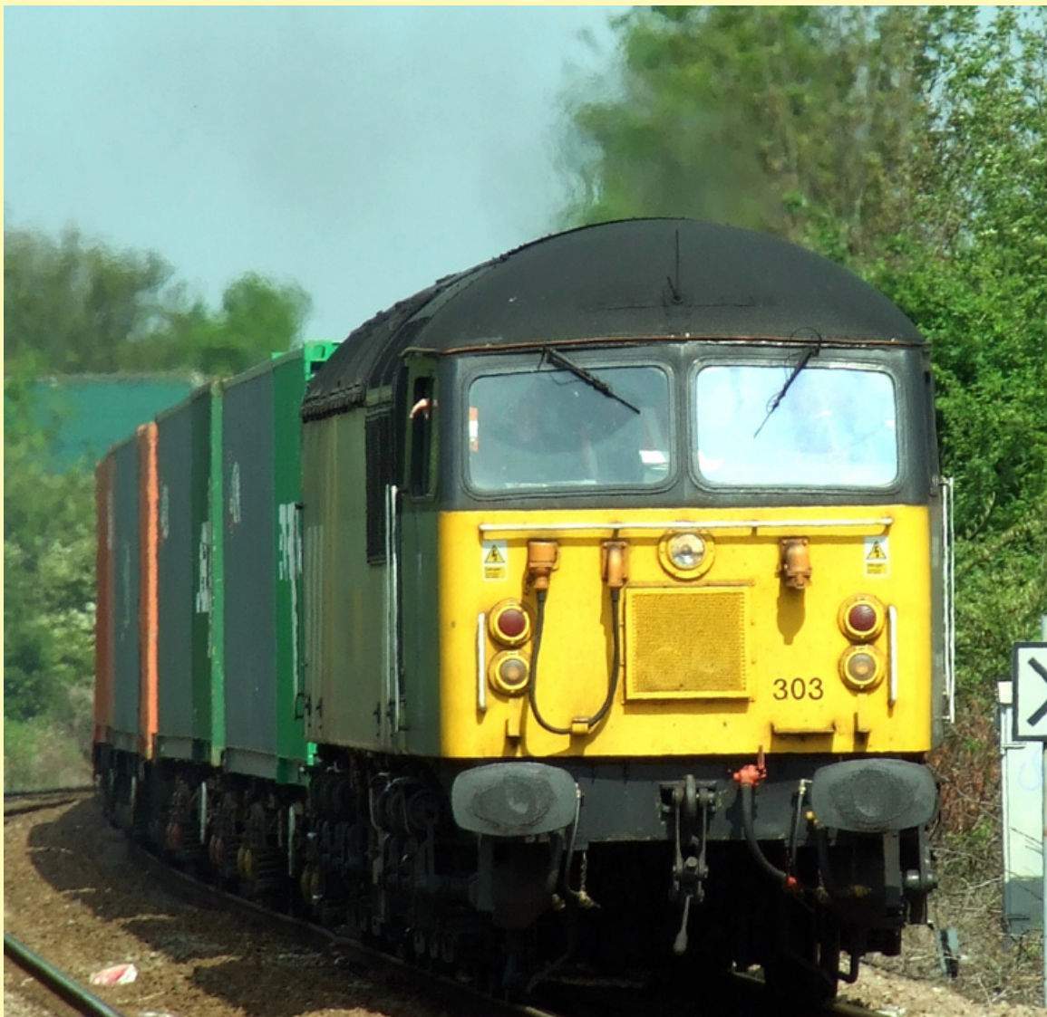
Above: Class 56 303 with the 4090 Doncaster - Thamesport (Grain) running through Carlton Station, Nottingham on the 6th May.