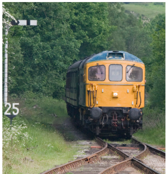
Several shots from the excellent Churnet Valley Diesel Gala held on the 31st May. Top Left: Visitor Class 73 138 working with the lines Southern unit approaches Consall. Above: Class 25 322 "Tamworth Castle" awaits repairs in Cheddleton Yard. Far Left: Visiting Deltic D9016 departs Consall. Left: Class 33 102 approaches Cheddleton. Below Class 37 075 at Kingsland and Froghall.