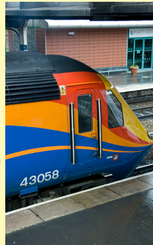
Right: Cab shot of the new livery for East Midlands Trains as carried on 43058.