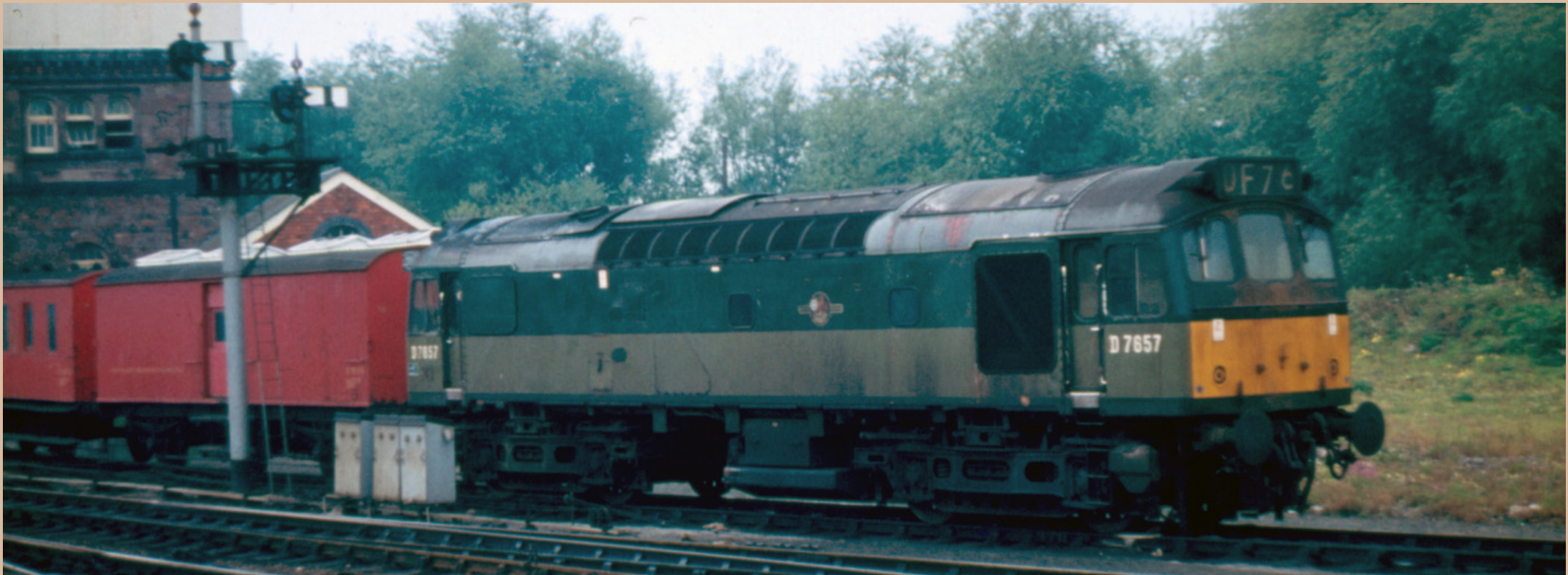
Above: On the 11th September 1971 A Class 25 D7657, in two-tone green, is seen at Exeter St Davids.