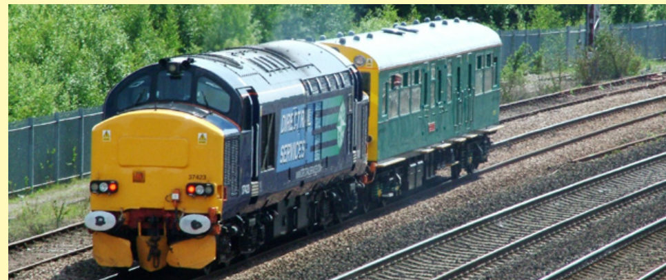
Bottom Right: Class 37 423 departs Wellingborough working back to Derby with 2Z04 passing the site of the old depot on 29th May. Derek Elston