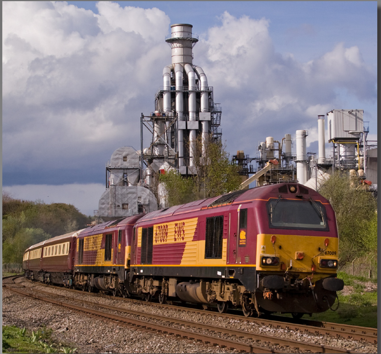
Above: Class 67 009 and 67 011 working 5Z37 Crewe - Gobowen pass Chirk on the 2nd May.