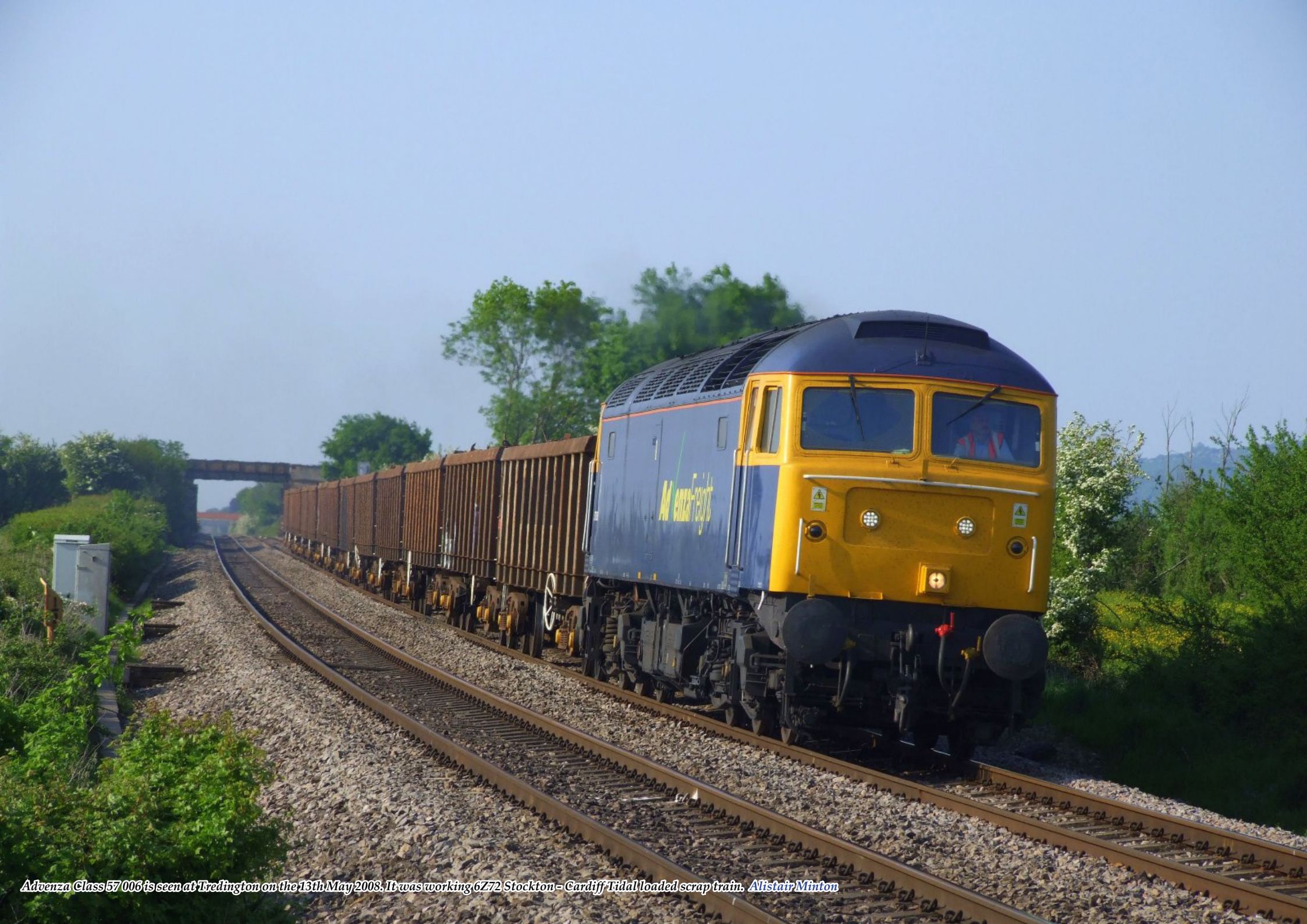
Advenza Class 57 006 fs seen at Tredington on the 13th May 2008. It was working 6Z72 Stockton - Cardiff Tidal loaded scrap train. Alistair Minton