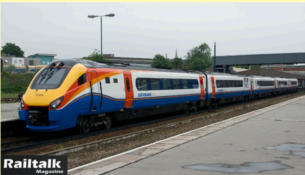
This was the second Meridian in EMT livery and the first one since 222 017 was unveiled at Derby in December 2007 when the EMT franchise was launched.