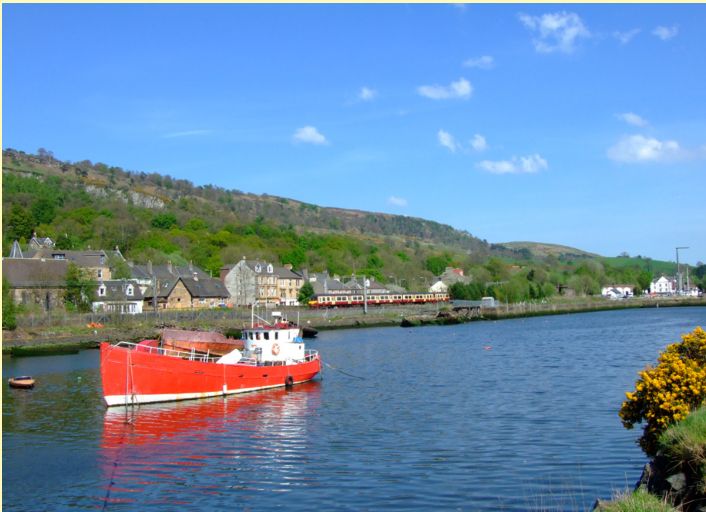
Above: A Class 320 working the 15.10 2H46 Helensburgh Central - Drumgelloch passes Bowling on the 5th May.