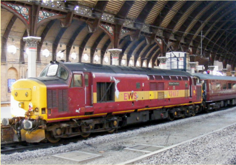
Above: A couple more from Grand Central. This is Class 37 417, with one of the many loco hauled runs in May substituting for HST unavailability. Class47