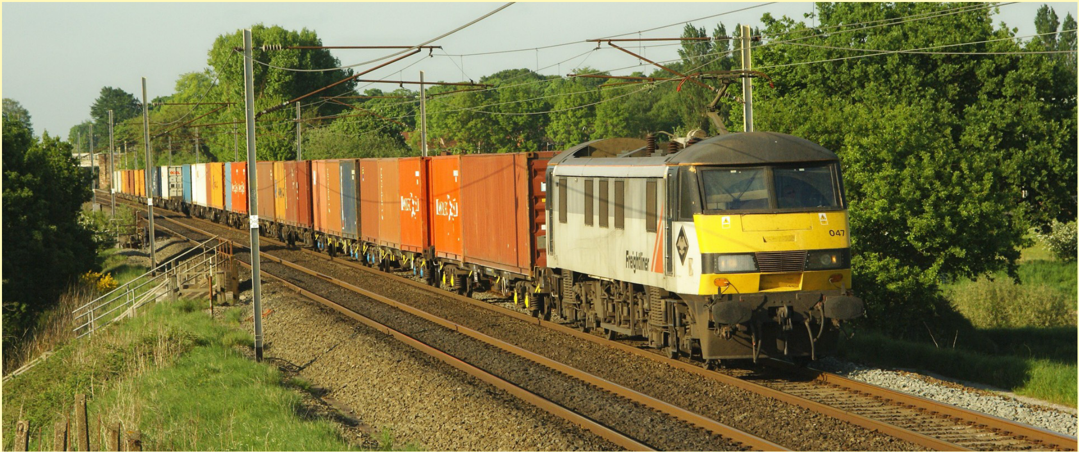
Above: Sunshine at last, as the 4M74 Coatbridge- Crewe passes Redbank on the 14th May, with Class 90 047 at the helm.