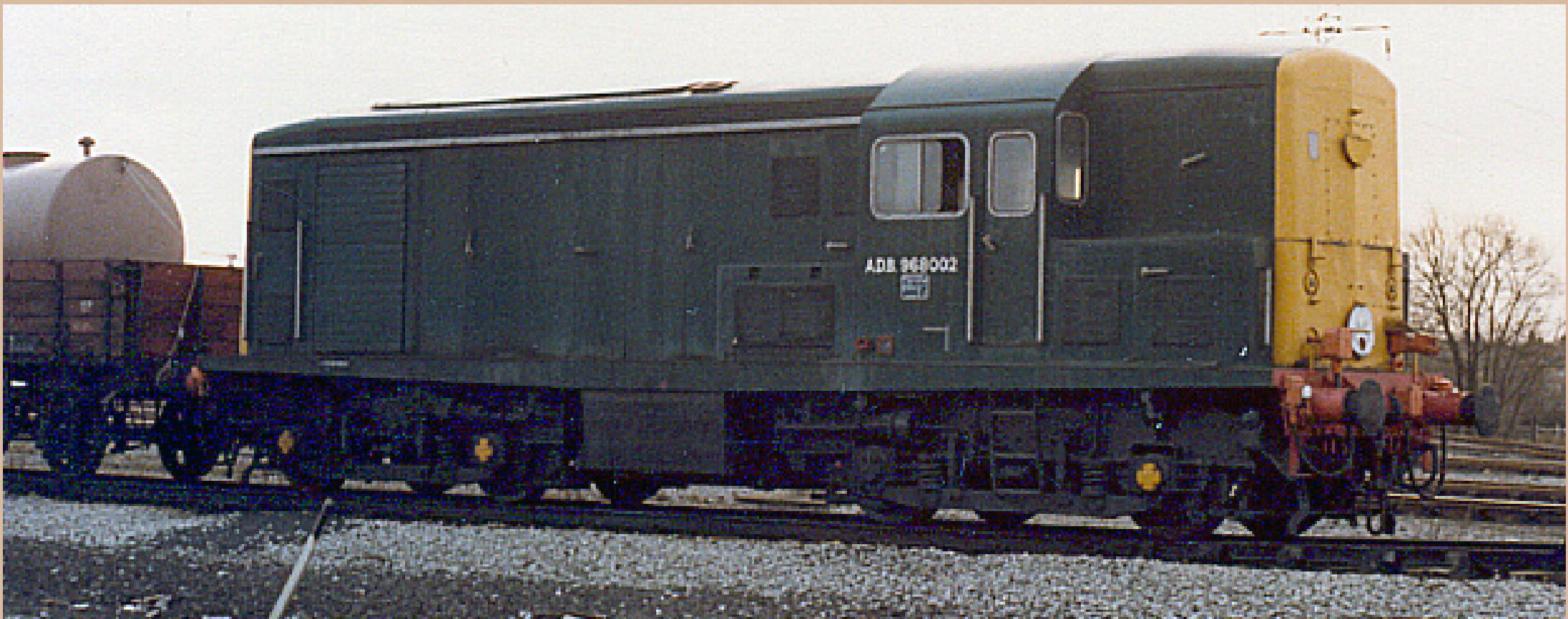
Above: A rare sight of ADB968002 in Toton yard on the 31st December 1983.