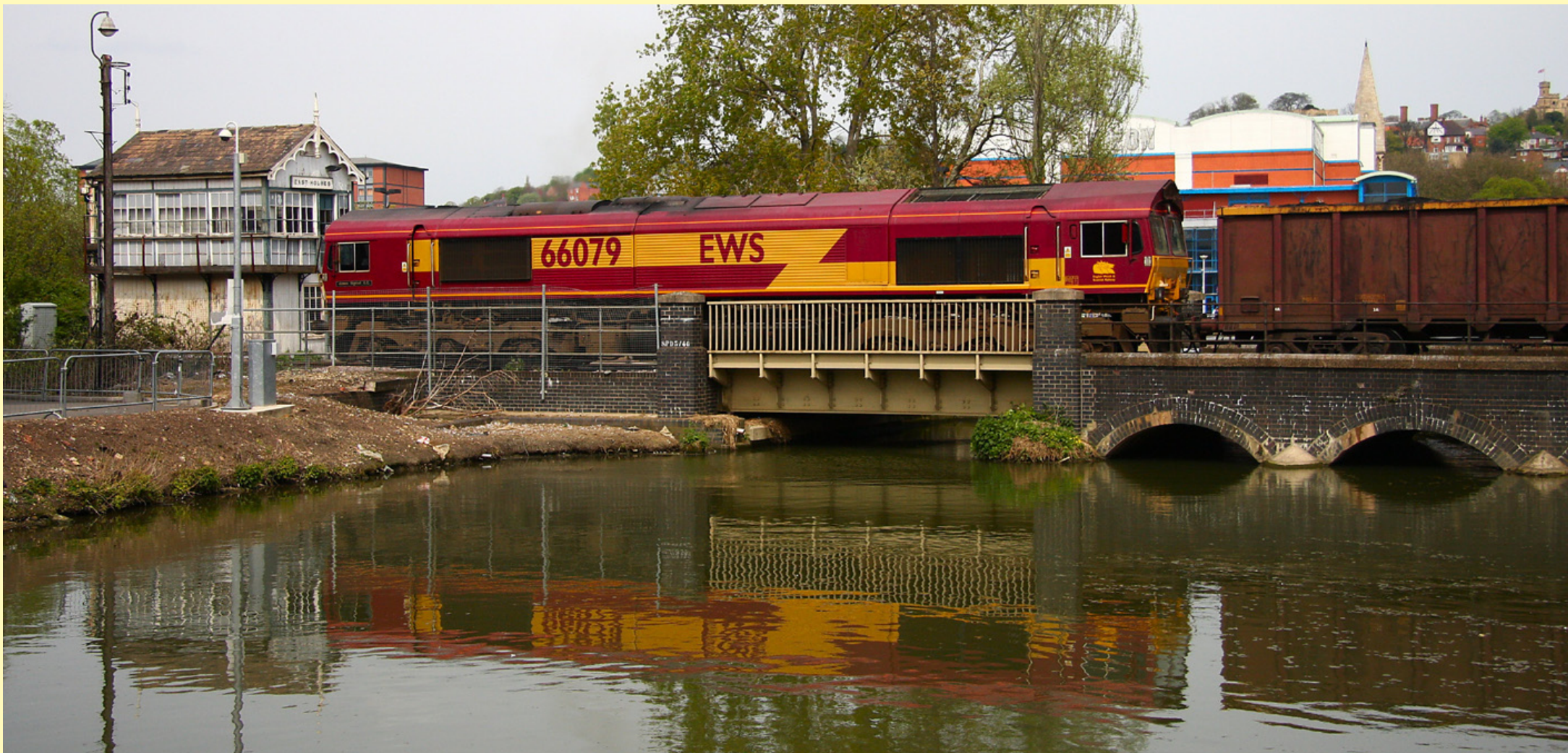
Above: Here is a shot that will soon be a distant memory. Class 66 079 Passing East Holmes Signal Box with an Immingham to Washwood Heath Coal train. East Holmes Signal Box will be no more after the resignalling of the Lincoln area is completed in August this year.