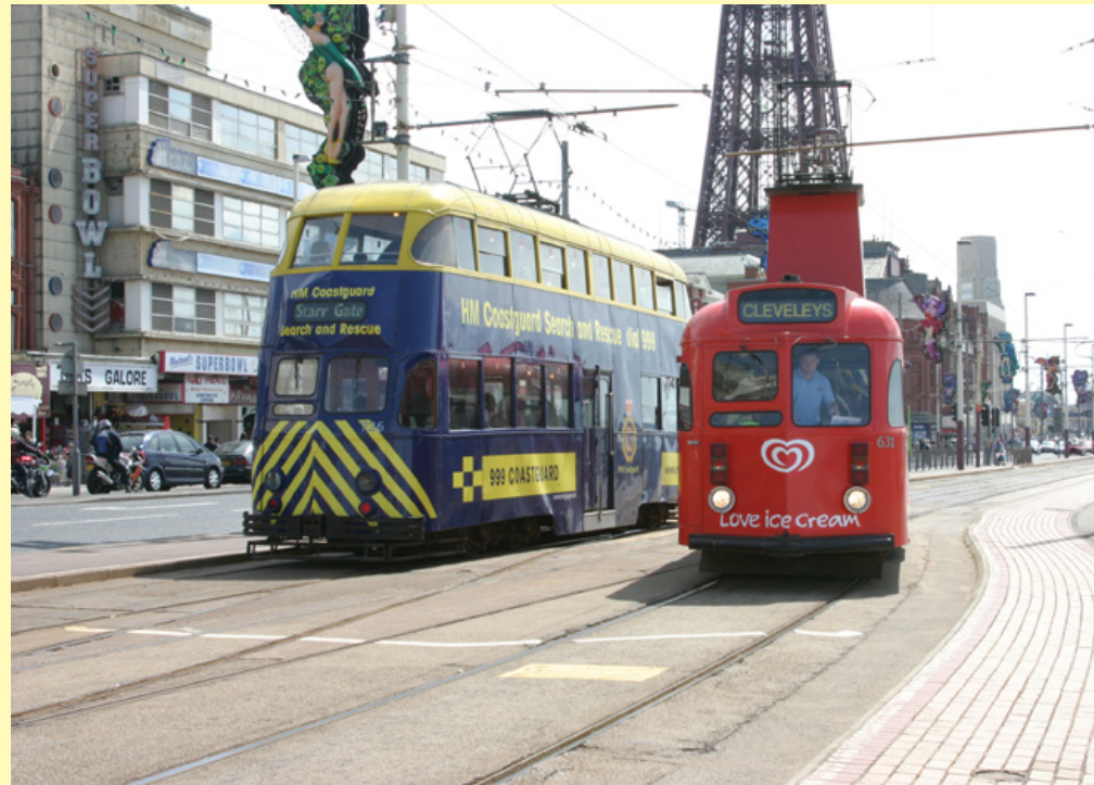
With the tramway back in action after the winter of repairs and closures, here is a selection of Blackpool Trams and several in new liveries for the 2008 season. All taken in May