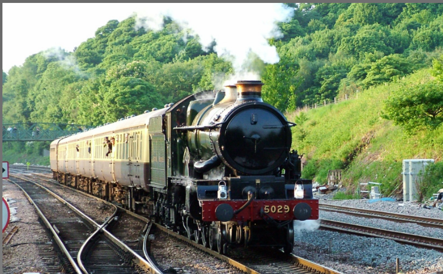
Top Left: 5029 "Nunney Castle" approaches Chesterfield with 1Z31 York - Tyseley working on the 24th May.