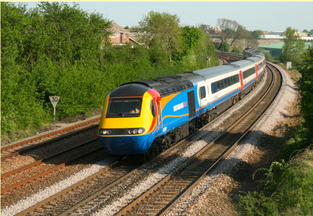
Left: The first HST in the new East Midlands Trains livery. This shot was taken on the 6th May 2008 and shows 43058 leading 43048 into Kettering, working wrong road due to an earlier fatality at Market Harborough.