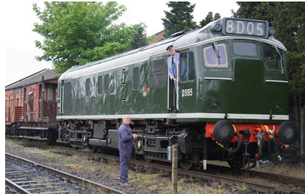
Above: Class 25 D5185 is seen at Loughborough in May with a freight train. Class47