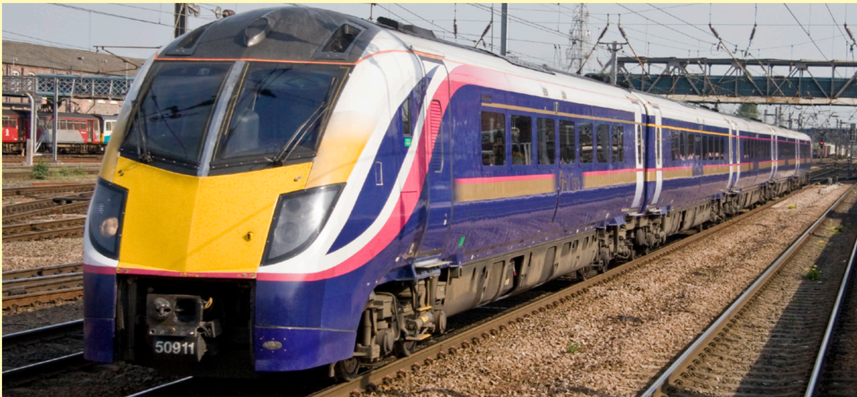
Left: Now in service, and branded Hull Trains, Class 180 111 makes a speedy departure from Doncaster. Will these units displace the current fleet of "Pioneers"?.