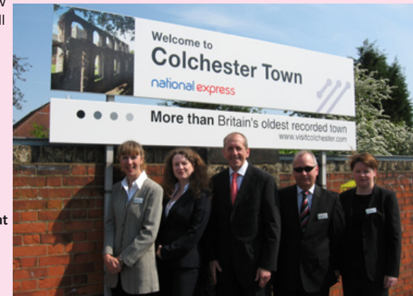
Photo right, shows representatives of National Express East Anglia, East of England Tourism and Colchester Borough Council at Colchester Town station .

"We are pleased to be working in partnership with Colchester Borough Council and East of England Tourism, to bring new visitors to the area to enjoy all that Colchester has to offer, whether it be the iconic heritage, the shopping or the lively arts scene."