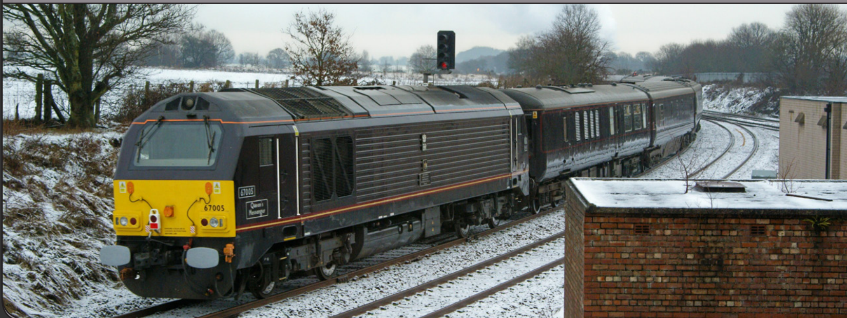
Bottom Left: Royal liveried DBS Class 67 005 suitably adorned at the rear of the Royal Train seen passing through Parkside Curve on February 4th.