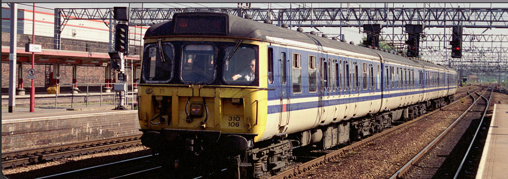
Bottom Left: Long before the Class 350's and Class 323's were even thought of, Birmingham - Liverpool services were in the hands of Class 310 units. In this photo Class 310 106 is seen travelling ECS through Crewe enroute to Liverpool Lime St. Brian Battersby