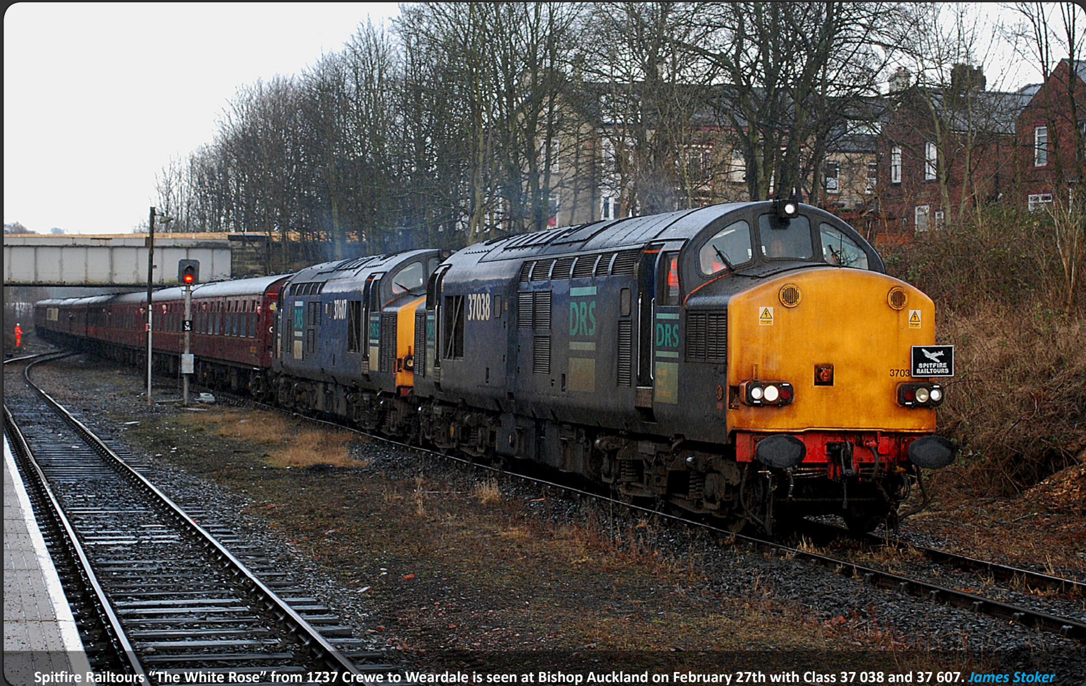
Spitfire Railtours "The White Rose" from 1237 Crewe to Weardale is seen at Bishop Auckland on February 27th with Class 37 038 and 37 607. James Stoker