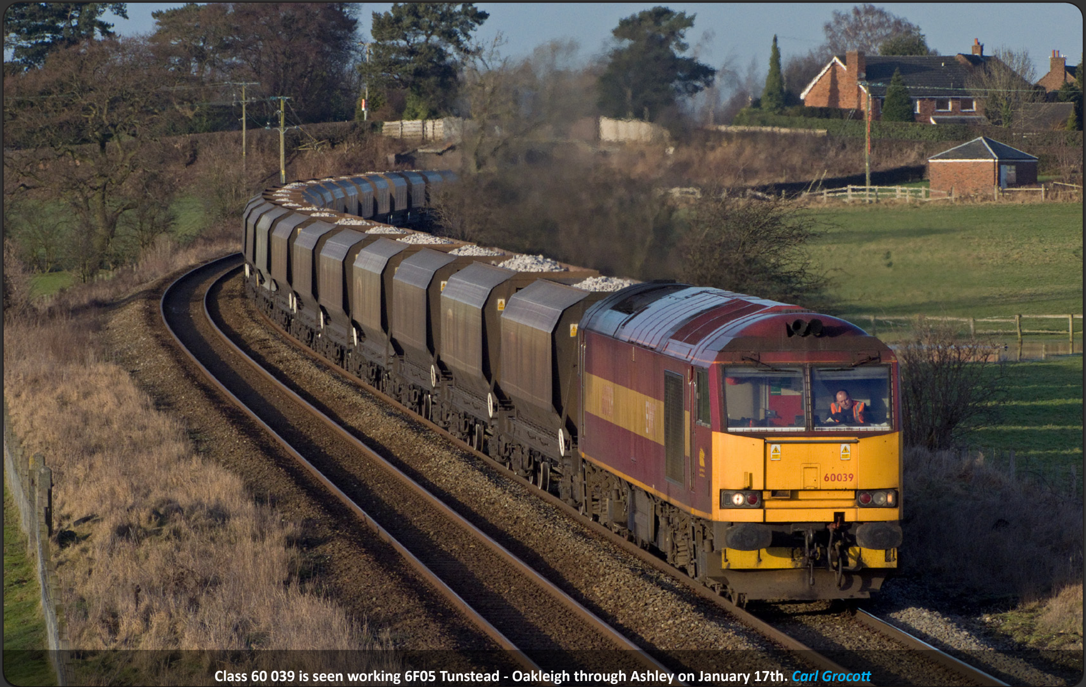
Class 60 039 is seen working 6F05 Tunstead - Oakleigh through Ashley on January 17th. Carl Grocott