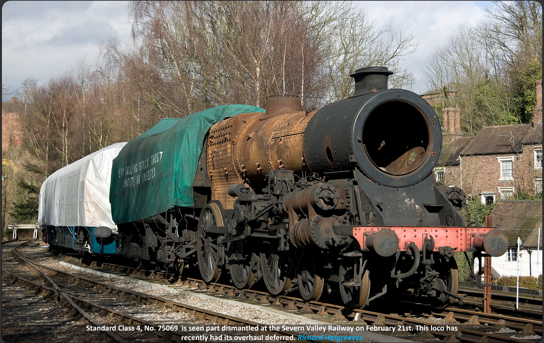
Standard Class 4, No. 75069 is seen part dismantled at the Severn Valley Railway on February 21st. This loco has recently had its overhaul deferred.