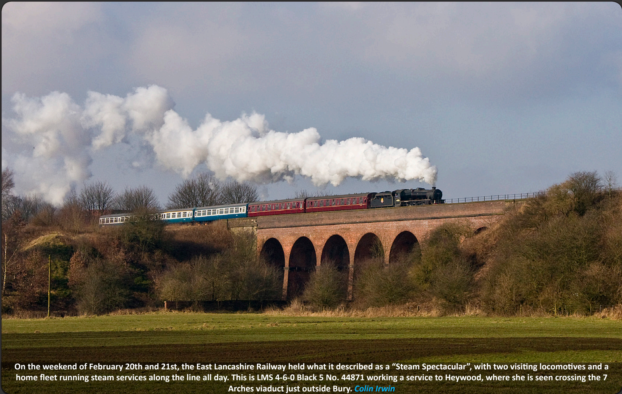
On the weekend of February 20th and 21st, the East Lancashire Railway held what it described as a “Steam Spectacular”, with two visiting locomotives and a home fleet running steam services along the line all day. This is LMS 4-6-0 Black 5 No. 44871 working a service to Heywood, where she is seen crossing the 7 Arches viaduct just outside Bury.