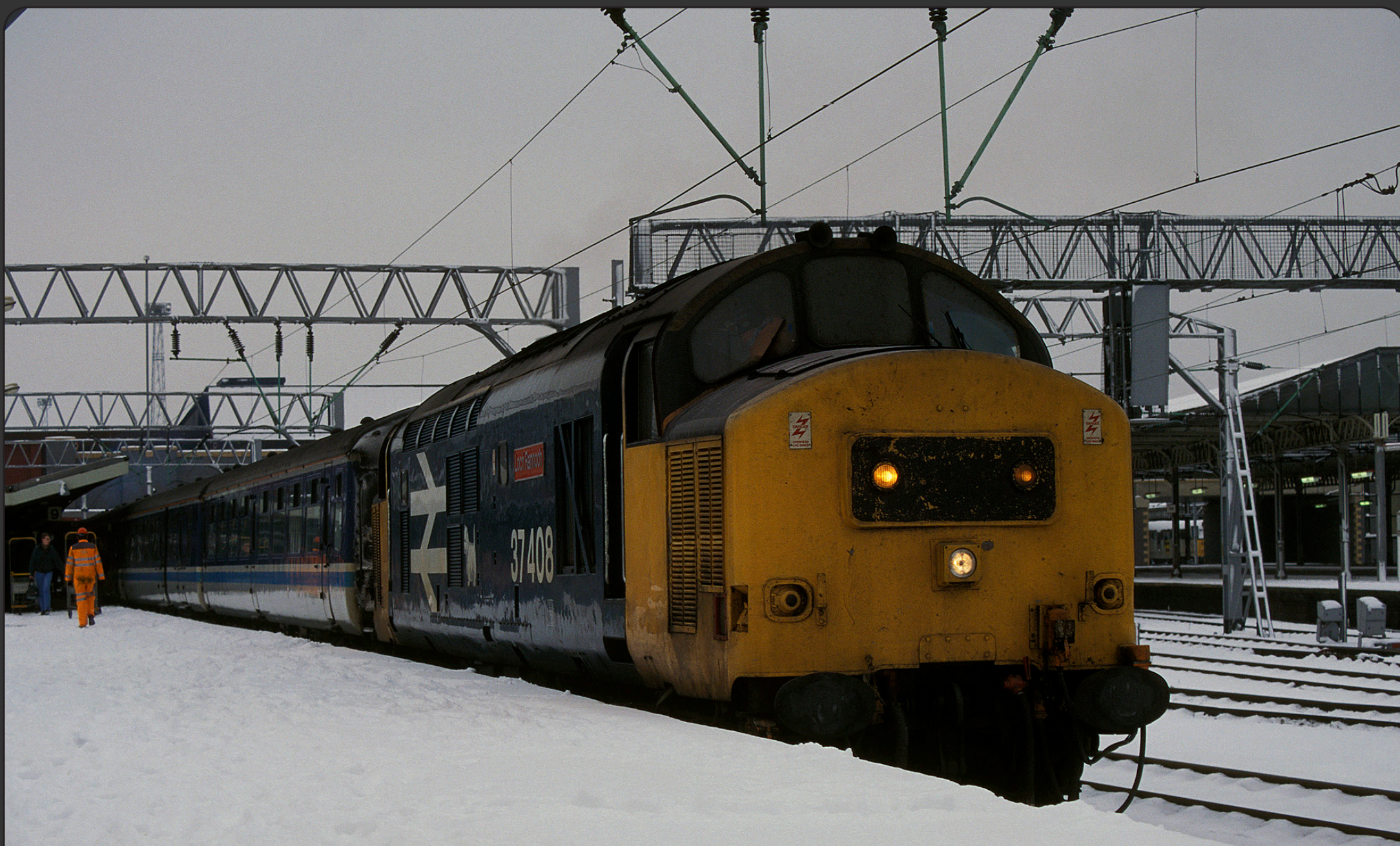
From the North Wales Coast, Class 37 408 stands at a snow covered Crewe on January 27th 1996 waiting to work a service to Bangor.