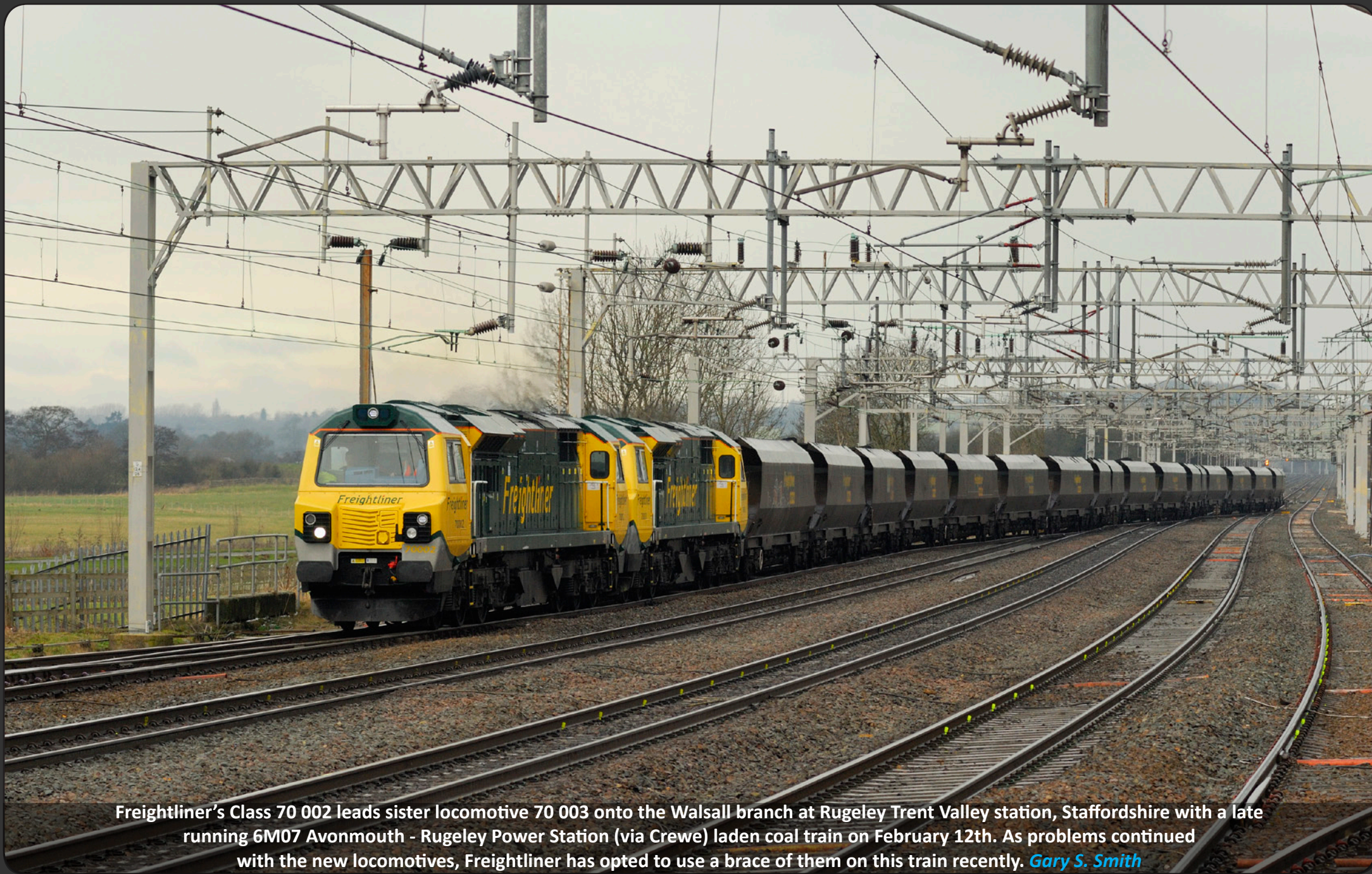
Freightliner's Class 70 002 leads sister locomotive 70 003 onto the Walsall branch at Rugeley Trent Valley station, Staffordshire with a late running 6M07 Avonmouth - Rugeley Power Station (via Crewe) laden coal train on February 12th. As problems continued with the new locomotives, Freightliner has opted to use a brace of them on this train recently. Gary S. Smith