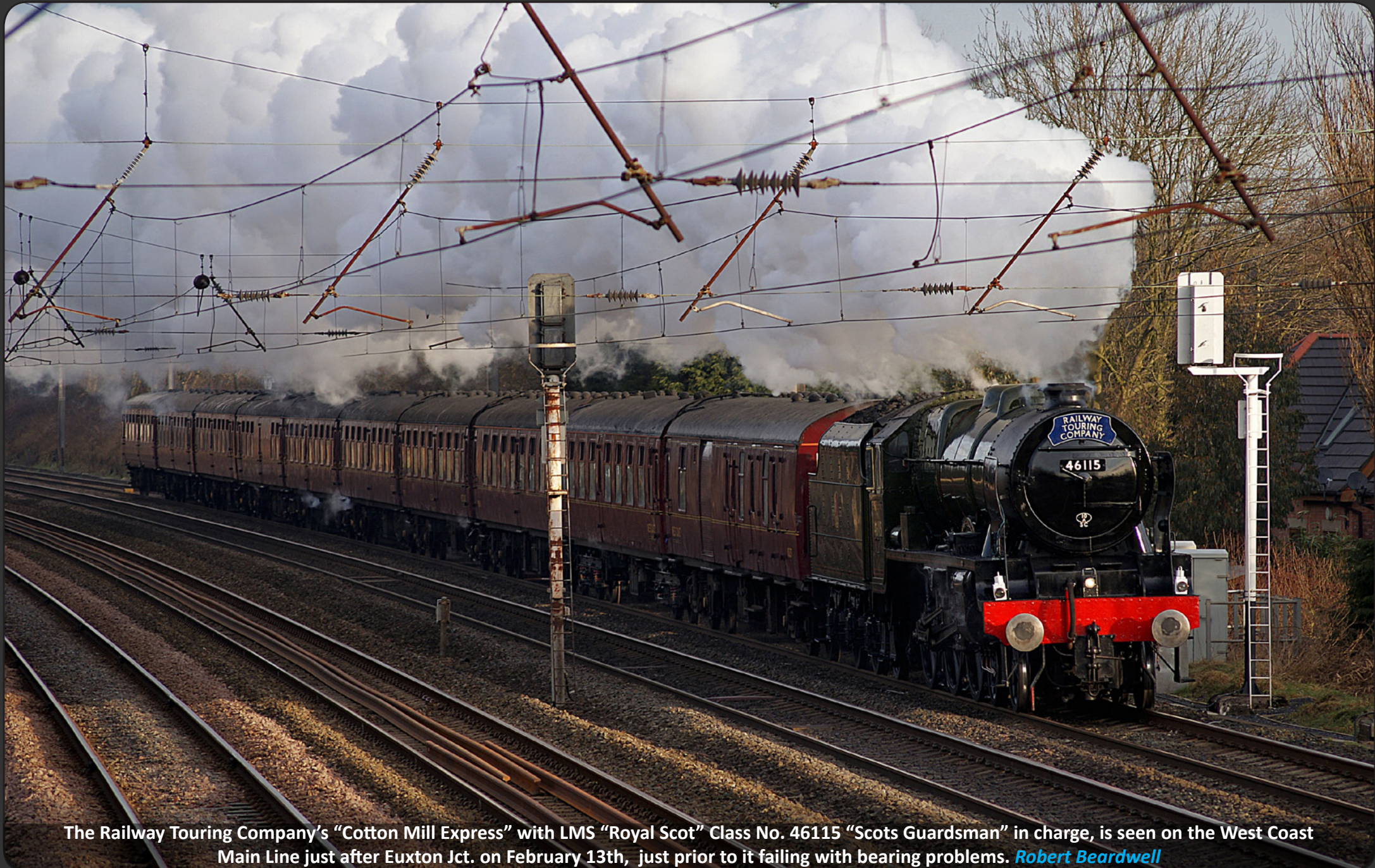
The Railway Touring Company's "Cotton Mill Express" with LMS "Royal Scot" Class No. 46115 "Scots Guardsman" in charge, is seen on the West Coast Main Line just after Euxton Jct. on February 13th, just prior to it failing with bearing problems.