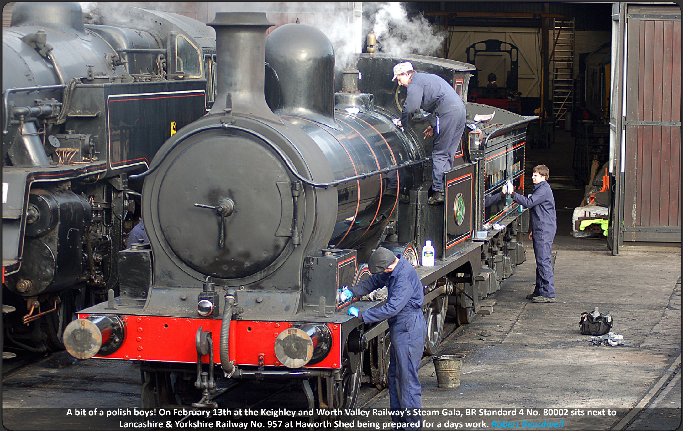
A bit of a polish boys! On February 13th at the Keighley and Worth Valley Railway's Steam Gala, BR Standard 4 No. 80002 sits next to Lancashire & Yorkshire Railway No. 957 at Haworth Shed being prepared for a days work.