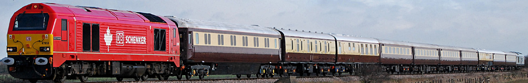
On 13th February Class 67 018 with 67 029 ran 1267 York - Retford via Harrogate & Leeds "Valentine Northern Belle" however 67 018 got into trouble at Micklefield with coolant problems which delayed the train by 25 minutes and limped into Gascoigne Wood from where 67 029 had to haul the train to Doncaster via Knottingley. Before all that though, Class 67 018 is seen passing Knaresborough on the outward journey.