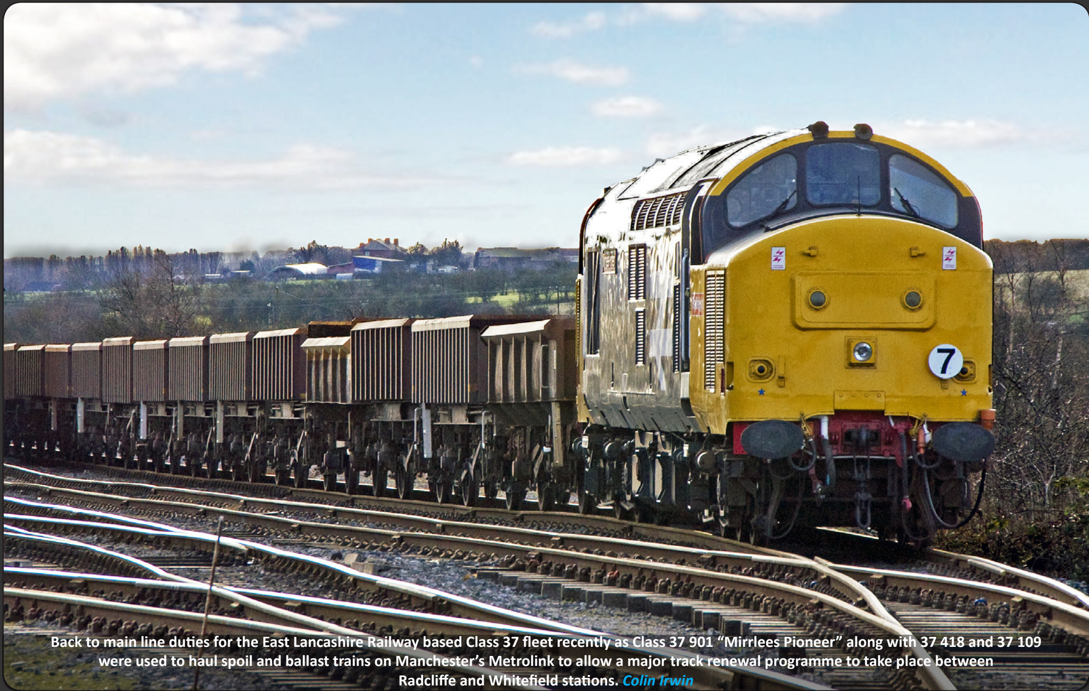
Back to main line duties for the East Lancashire Railway based Class 37 fleet recently as Class 37 901 “Mirrlees Pioneer” along with 37 418 and 37 109 were used to haul spoil and ballast trains on Manchester’s Metrolink to allow a major track renewal programme to take place between Radcliffe and Whitefield stations. Colin Irwin