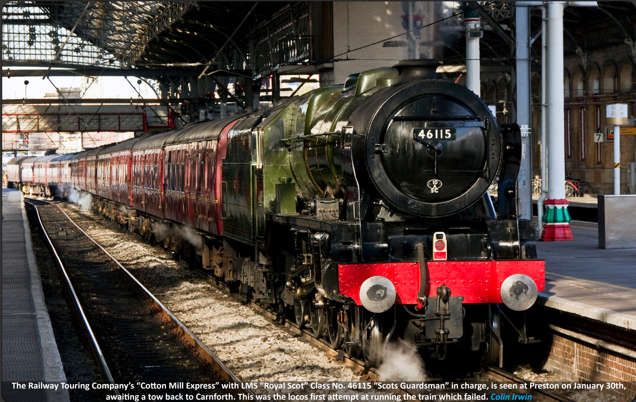
The Railway Touring Company's "Cotton Mill Express" with LMS "Royal Scot" Class No. 46115 "Scots Guardsman" in charge, is seen at Preston on January 30th, awaiting a tow back to Carnforth. This was the locos first attempt at running the train which failed.