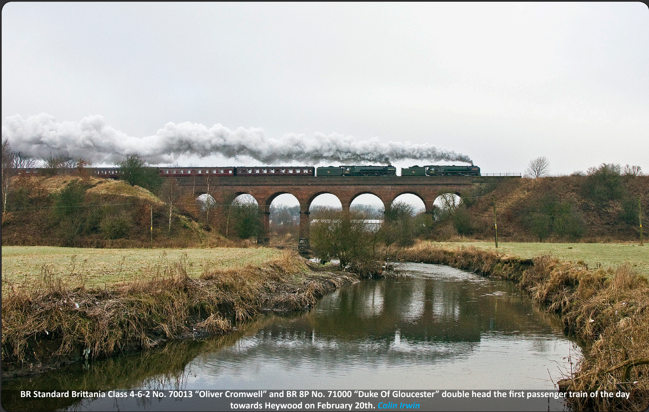
BR Standard Britannia Class 4-6-2 No. 70013 "Oliver Cromwell" and BR 8P No. 71000 "Duke Of Gloucester" double head the first passenger train of the day towards Heywood on February 20th. Colin Irwin