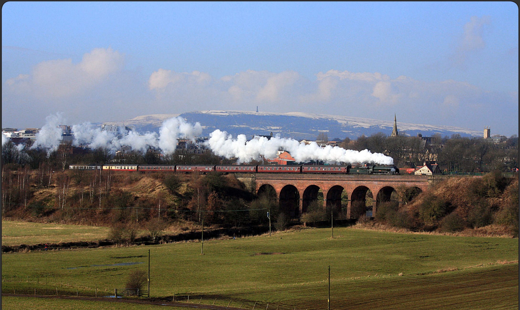
At the East Lancashire Railway's "Steam Spectacular" on February 20th, Southern Railway "King Arthur" Class No. 30777 "Sir Lamiel" pulls across the 7 Arches viaduct, just outside Bury, with a train from Rawtenstall to Bury.