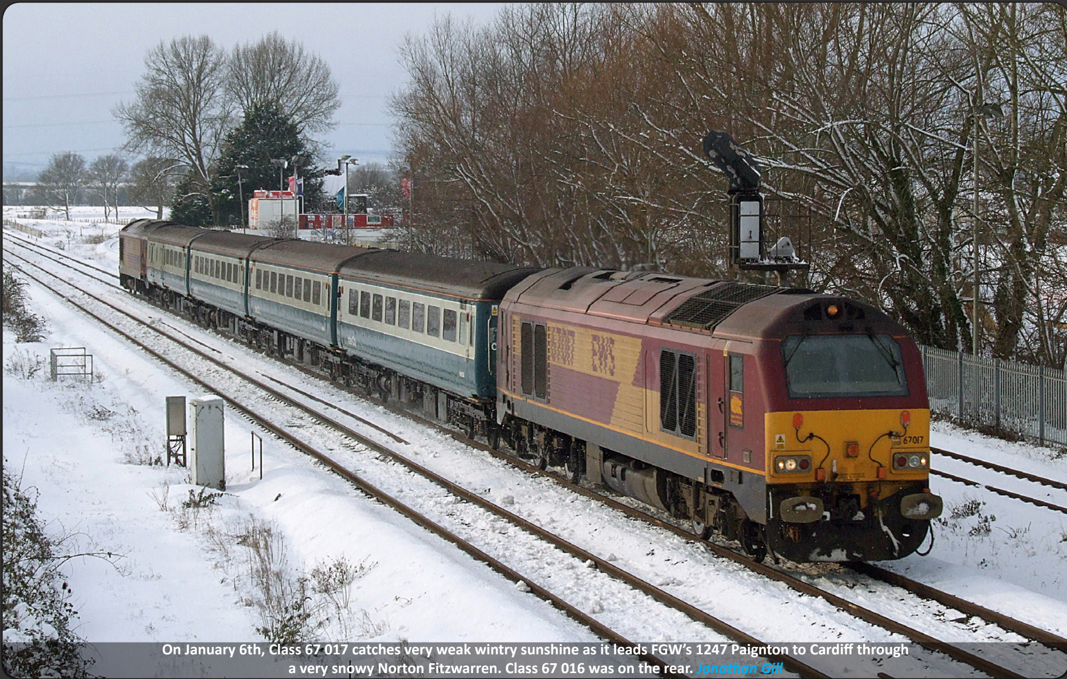
On January 6th, Class 67 017 catches very weak wintry sunshine as it leads FGW's 1247 Paignton to Cardiff through a very snowy Norton Fitzwarren. Class 67 016 was on the rear.