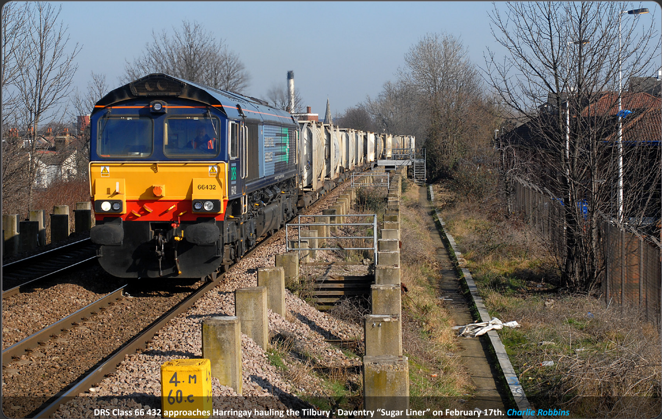
DRS Class 66 432 approaches Harringay hauling the Tilbury - Daventry "Sugar Liner" on February 17th.