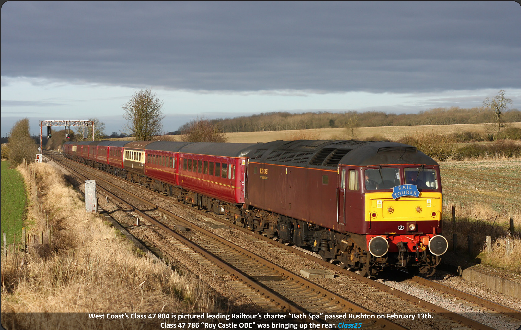
West Coast's Class 47 804 is pictured leading Railtour's charter "Bath Spa" passed Rushton on February 13th. Class 47 786 "Roy Castle OBE" was bringing up the rear. Class25