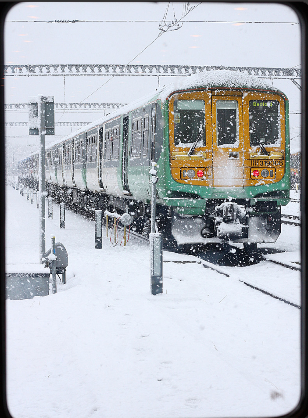
Right: First Capital Connect Class 319 008, still in Southern livery, stands outside the shed at Cauldwell Depot, Bedford during a heavy snow shower. This shot was taken through the shed doors. Class25