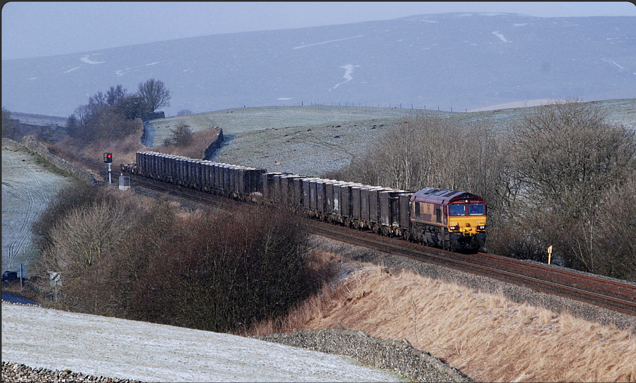
With light snow in the air, Class 66 186 works the S&C through Horton in Ribblesdale with a southbound gypsum train on February 10th. David Hollowood