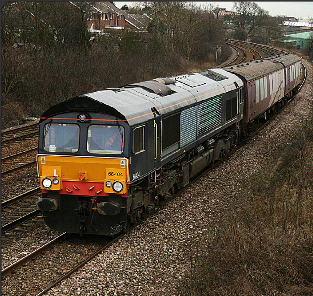
Above: Class 66 404 with two barrier vehicles is seen at Headlands Bridge Kettering on February 25th, en route to Derby to collect a unit.