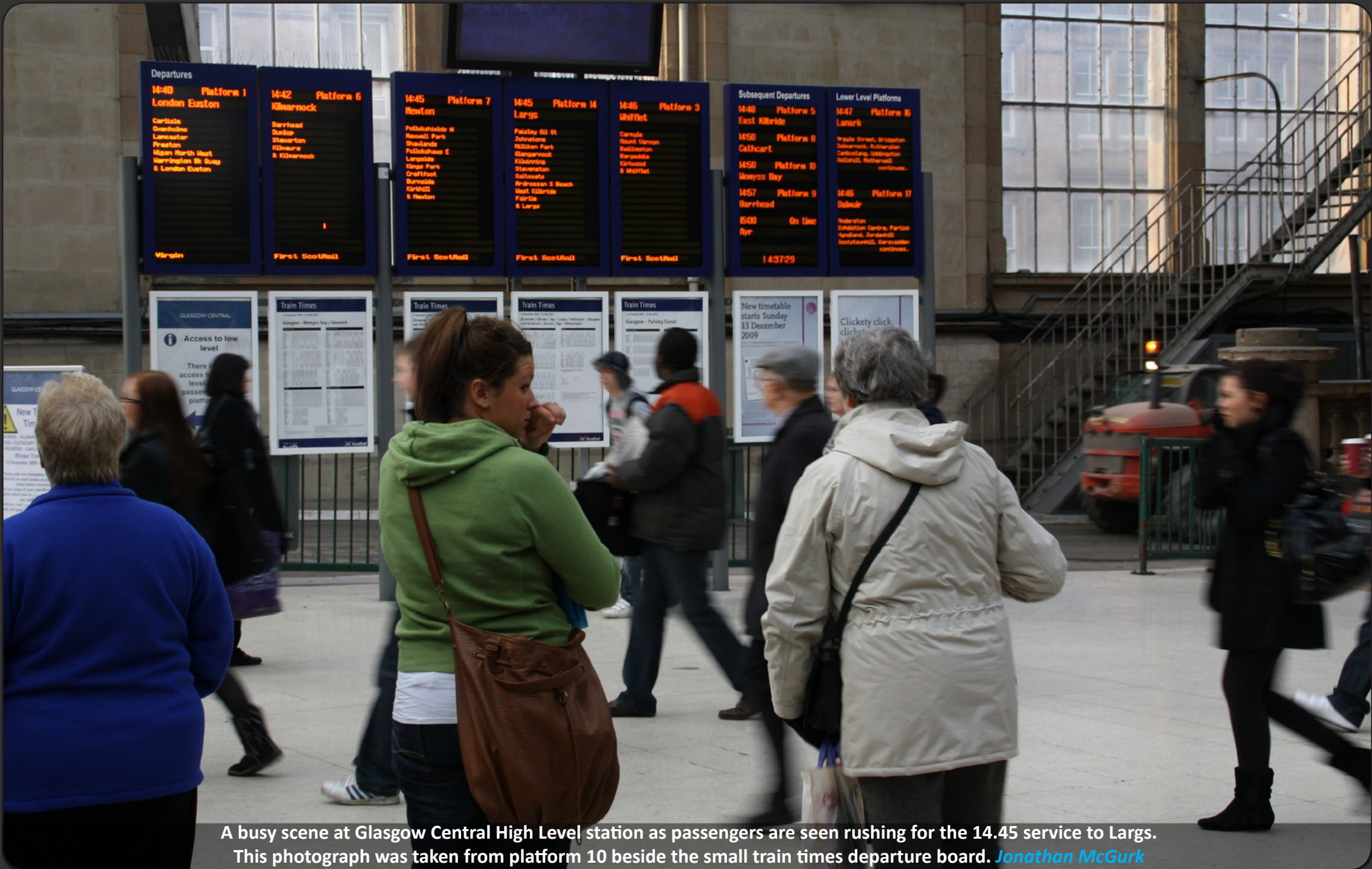
A busy scene at Glasgow Central High Level station as passengers are seen rushing for the 14.45 service to Largs. This photograph was taken from platform 10 beside the small train times departure board. Jonathan McGurk