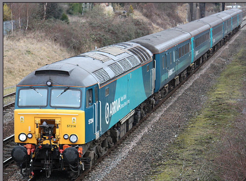
Bottom Right: In conjunction with Rugby Internationals at Cardiff, Arriva organised a strengthened WAG set to operate on most match dates. Class 57 314 works past Kemp's Eye, Shrewsbury heading for Cardiff on February 13th.