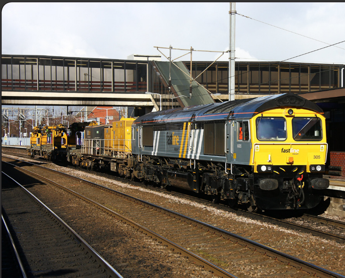
Above: Class 66 305 passes through Bedford Station en route from Doncaster to Thorney Mill on February 9th, on what we believe to be only the second Fastline Freight Class 66 working south of Wigston on the MML. Class25