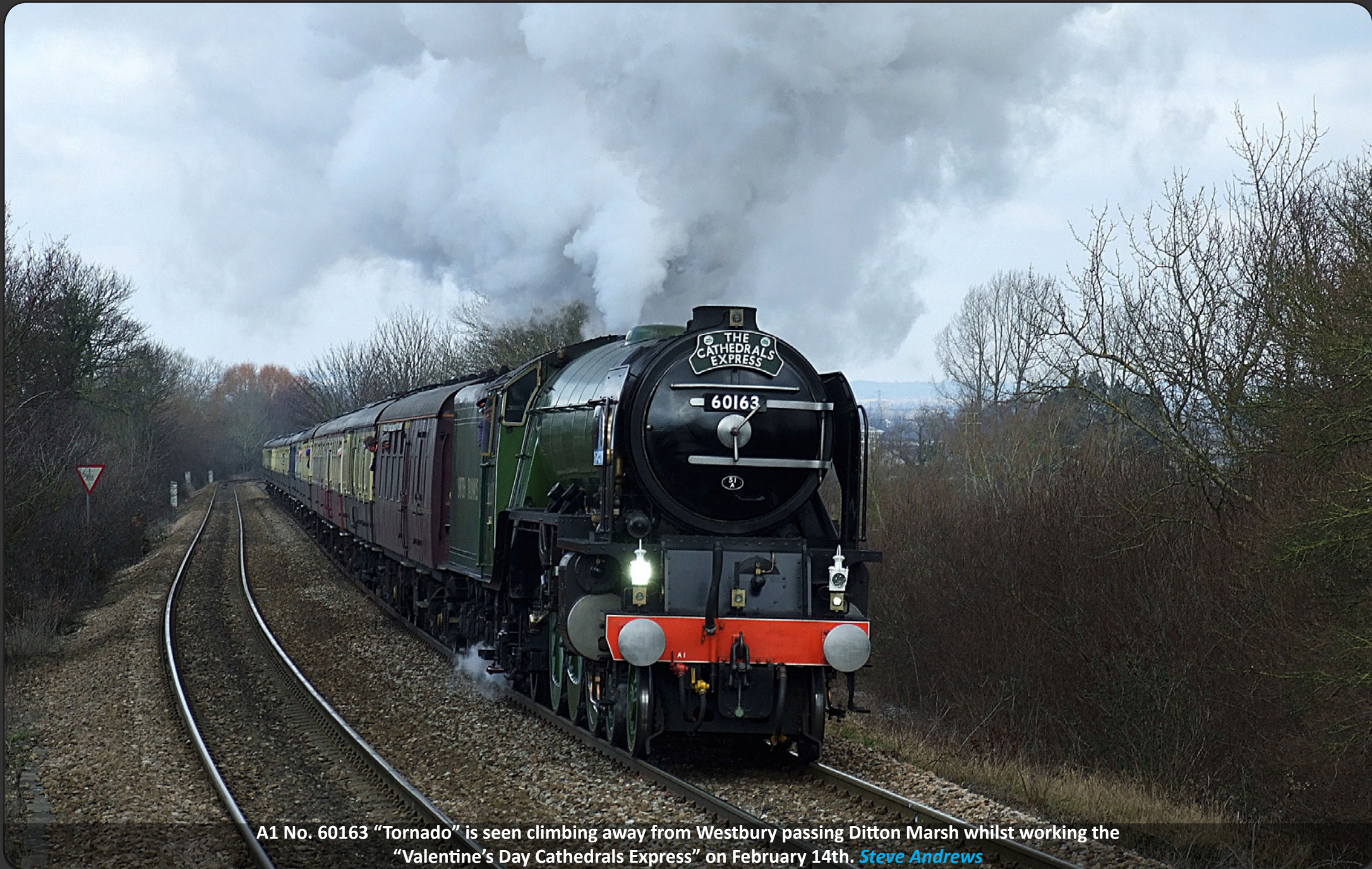
A1 No. 60163 "Tornado" is seen climbing away from Westbury passing Ditton Marsh whilst working the "Valentine's Day Cathedrals Express" on February 14th.