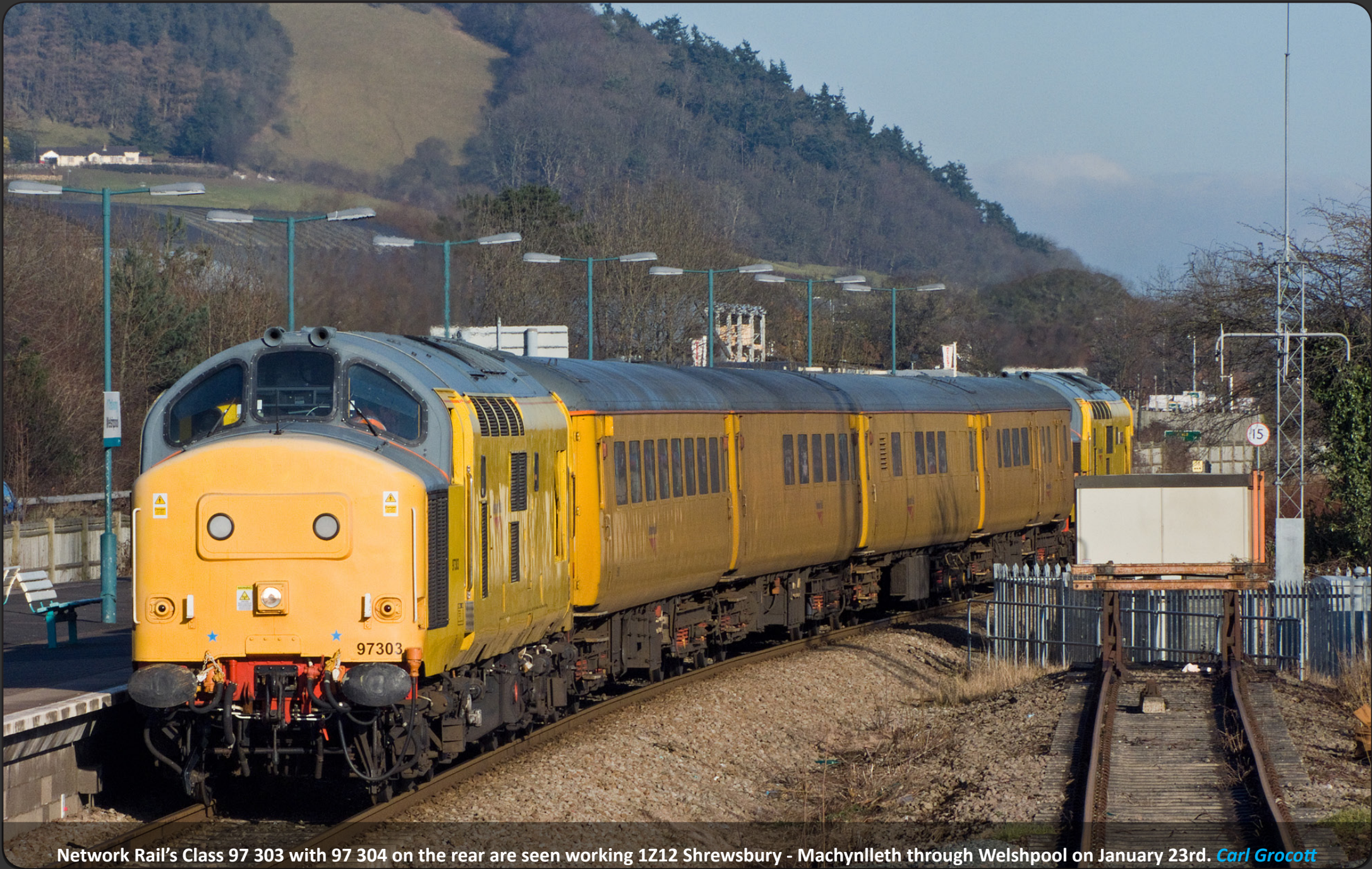
Network Rail's Class 97 303 with 97 304 on the rear are seen working 1Z12 Shrewsbury - Machynlleth through Welshpool on January 23rd. Carl Grocott