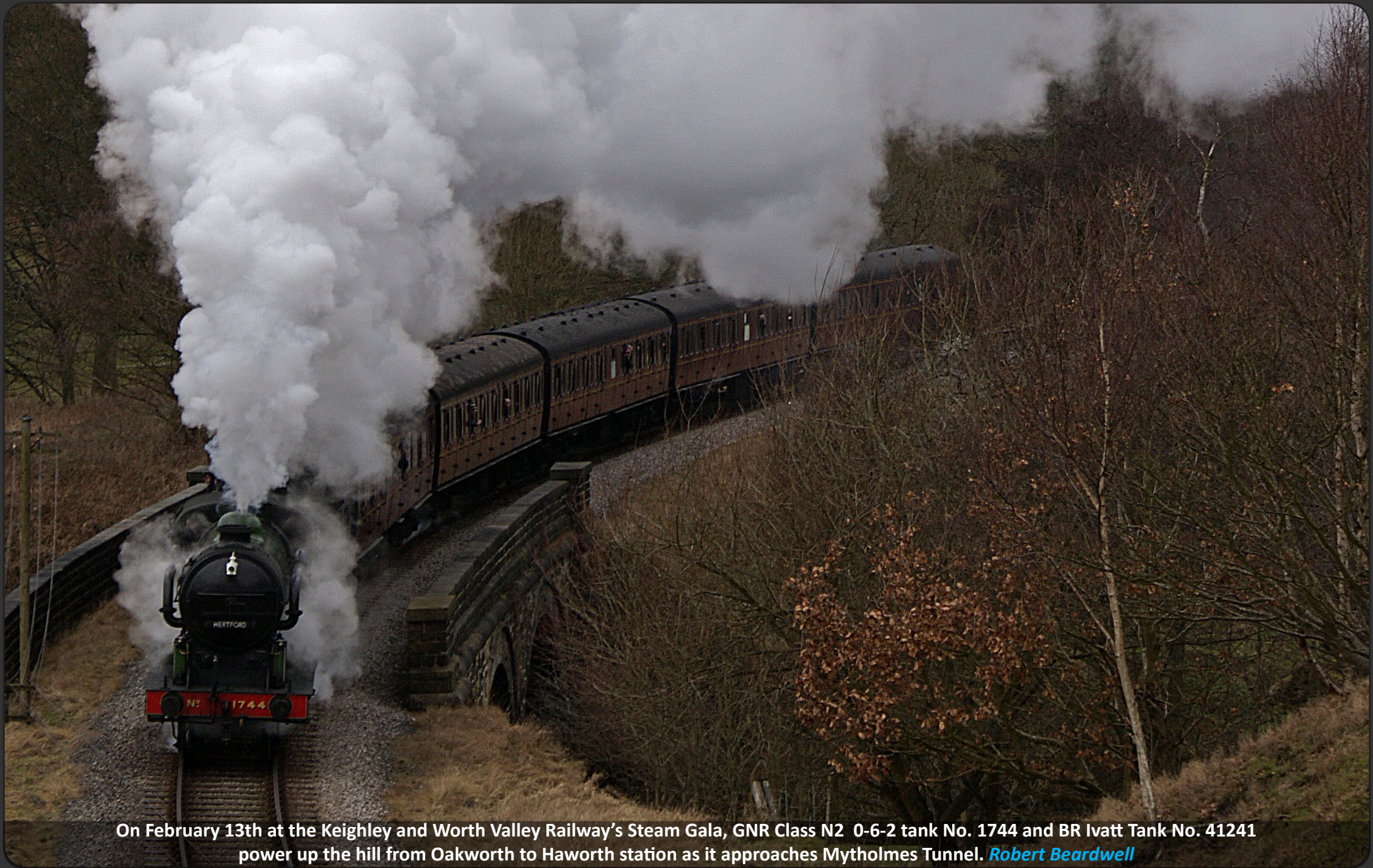
On February 13th at the Keighley and Worth Valley Railway's Steam Gala, GNR Class N2 0-6-2 tank No. 1744 and BR Ivatt Tank No. 41241 power up the hill from Oakworth to Haworth station as it approaches Mytholmes Tunnel.