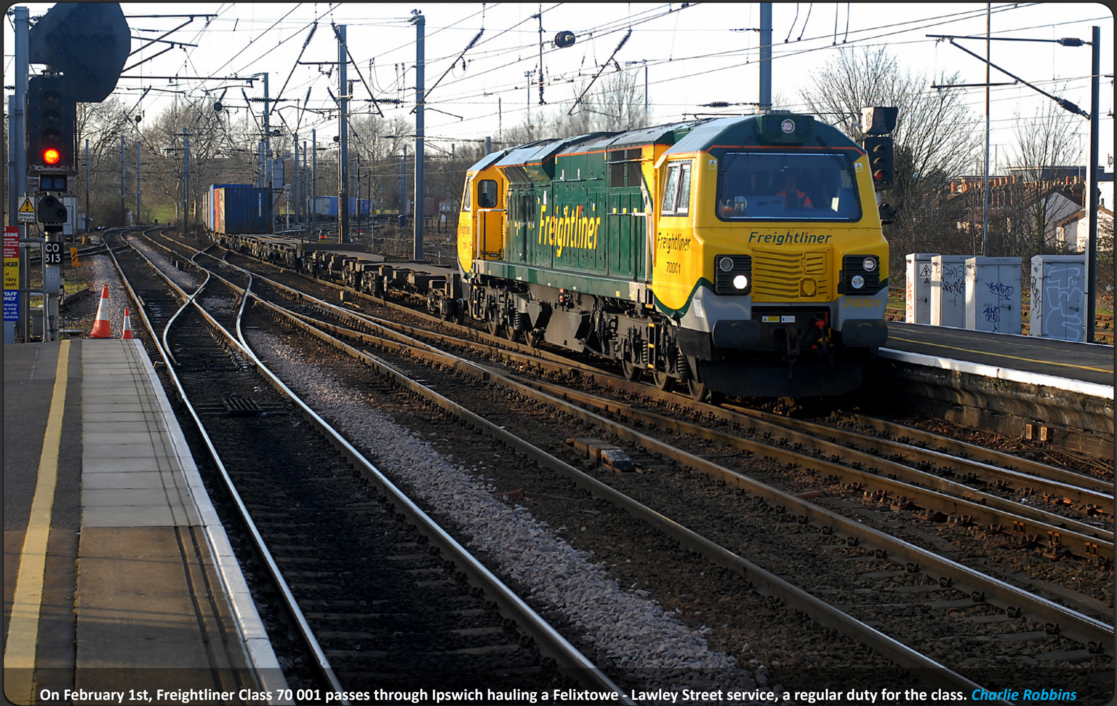
On February 1st, Freightliner Class 70 001 passes through Ipswich hauling a Felixtowe - Lawley Street service, a regular duty for the class.