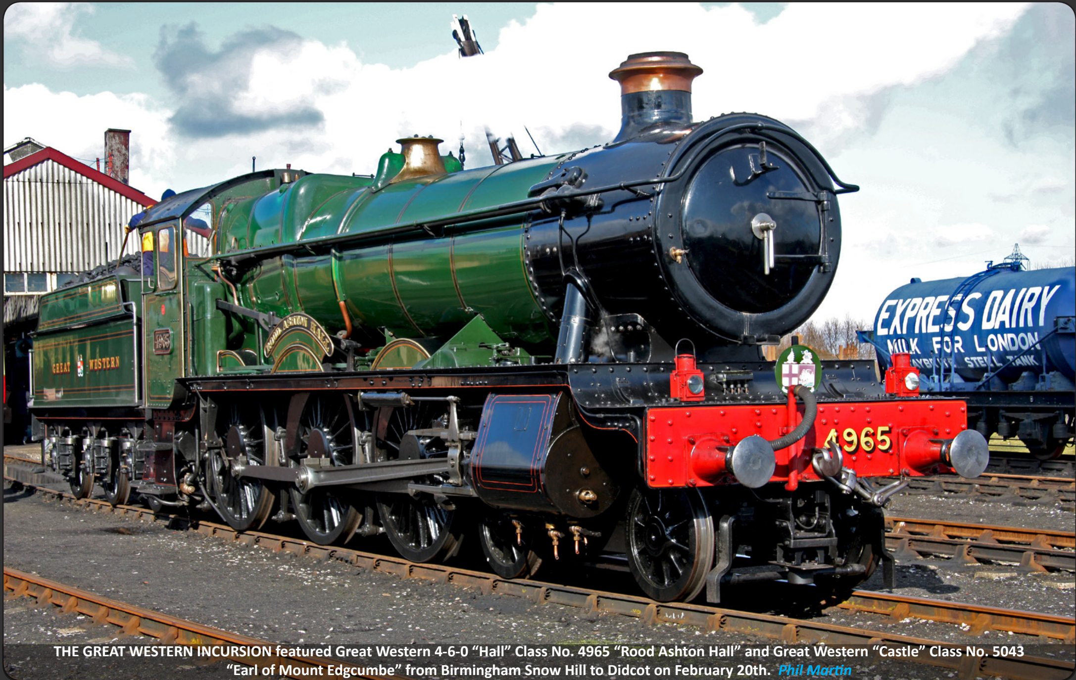
THE GREAT WESTERN INCURSION featured Great Western 4-6-0 "Hall" Class No. 4965 "Rood Ashton Hall" and Great Western "Castle" Class No. 5043 "Earl of Mount Edgcombe" from Birmingham Snow Hill to Didcot on February 20th.