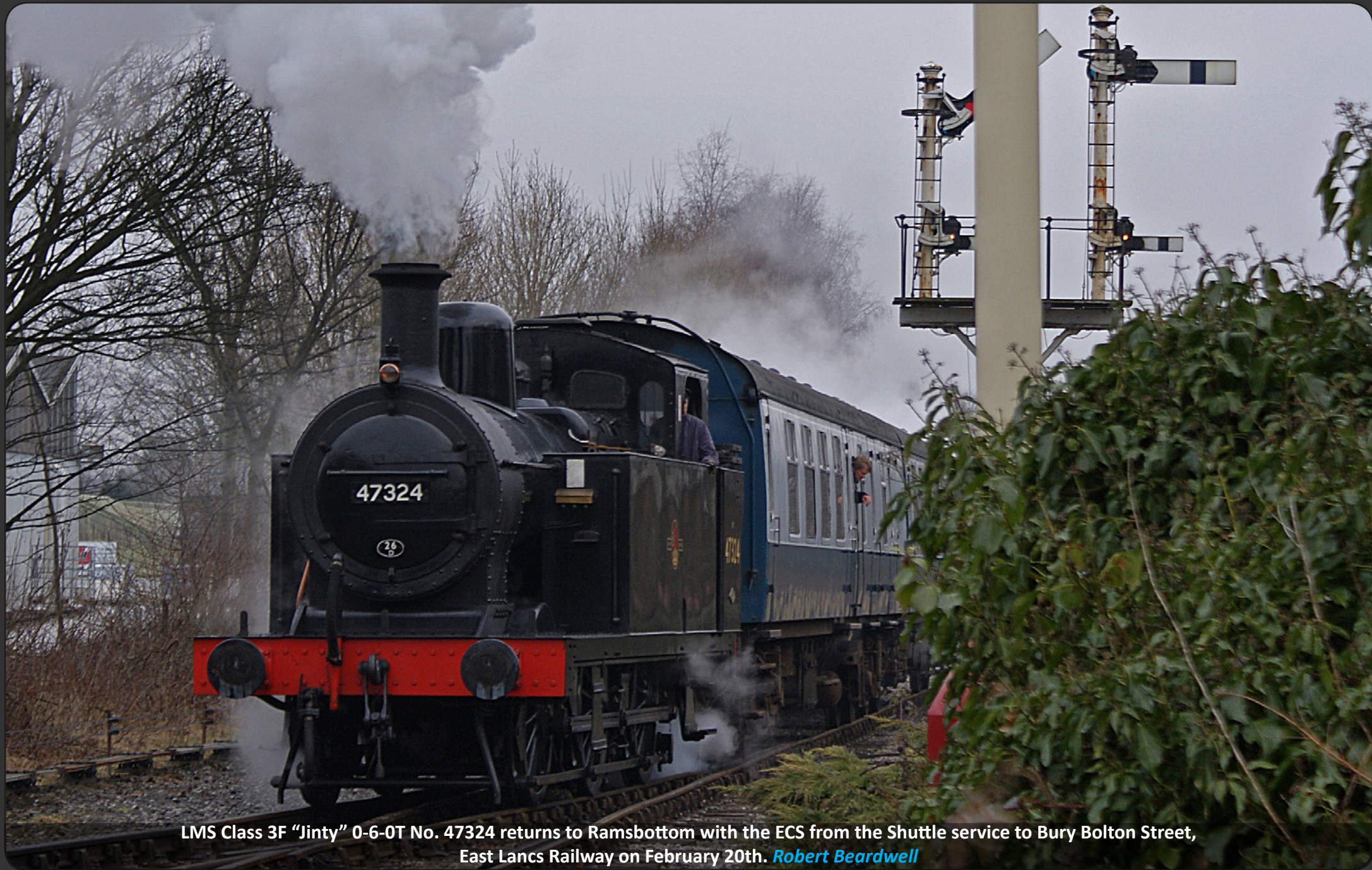
LMS Class 3F "Jinty" 0-6-0T No. 47324 returns to Ramsbottom with the ECS from the Shuttle service to Bury Bolton Street, East Lancs Railway on February 20th.