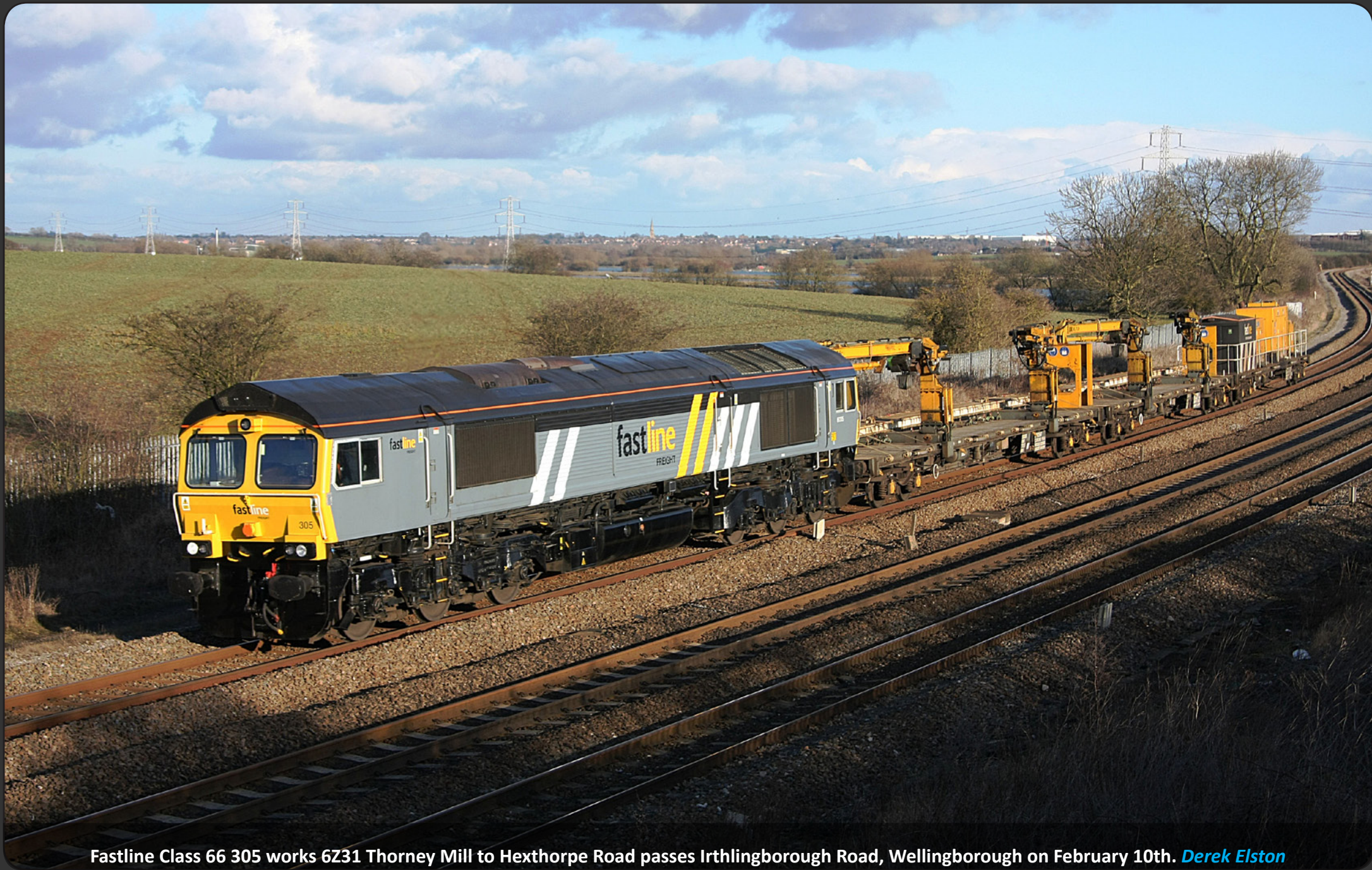
Fastline Class 66 305 works 6Z31 Thorney Mill to Hexthorpe Road passes Irthlingborough Road, Wellingborough on February 10th. Derek Elston