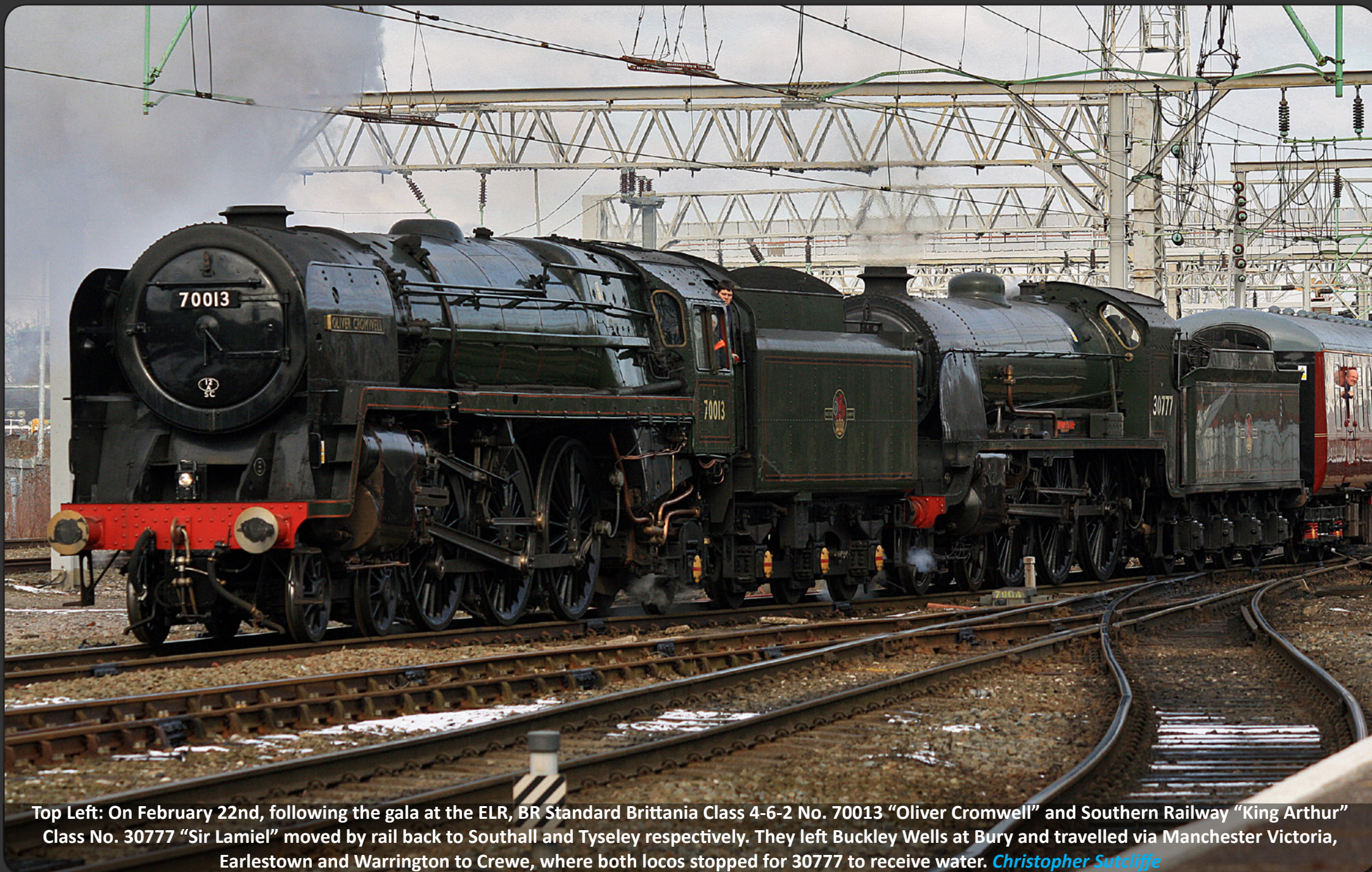
Top Left: On February 22nd, following the gala at the ELR, BR Standard Britannia Class 4-6-2 No. 70013 "Oliver Cromwell" and Southern Railway "King Arthur" Class No. 30777 "Sir Lamiel" moved by rail back to Southall and Tyseley respectively. They left Buckley Wells at Bury and travelled via Manchester Victoria, Earlestown and Warrington to Crewe, where both locos stopped for 30777 to receive water.