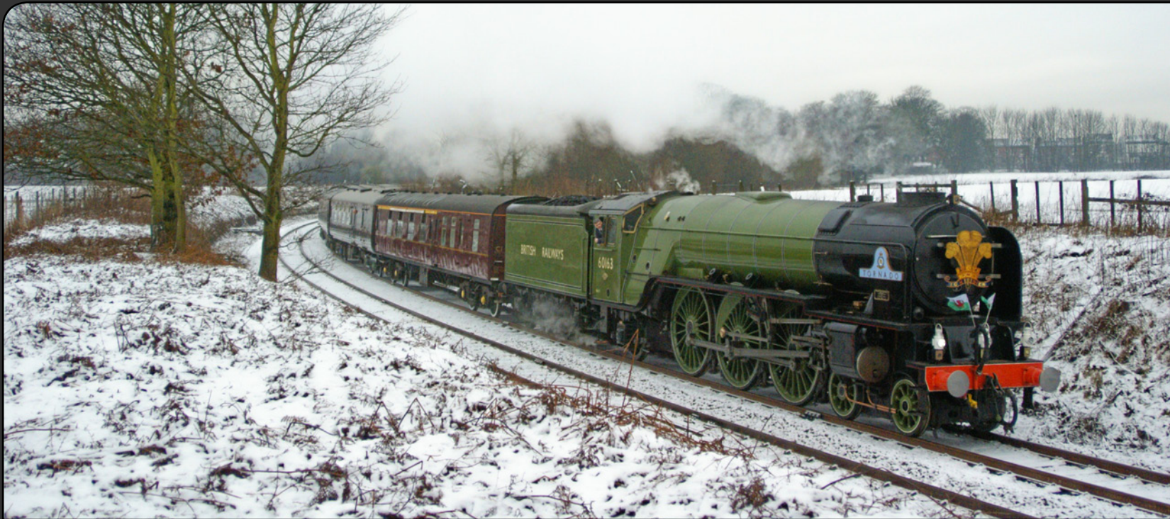
Top Left: In conjunction with HRH Prince Charles visit to Manchester. Tornado takes the Royal Train through the rarely used freight only line at Parkside Curve on February 4th.