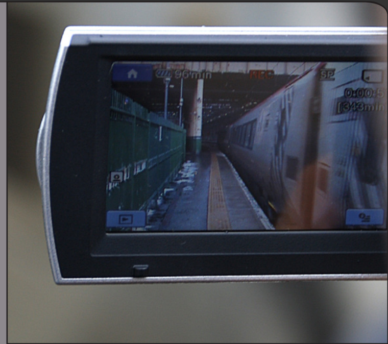
Above: Class 221 143 is seen through a video camera departing platform 11 at Edinburgh Waverley station while working the 12.52 1M56 Edinburgh Waverley - Birmingham New Street Virgin West Coast service.