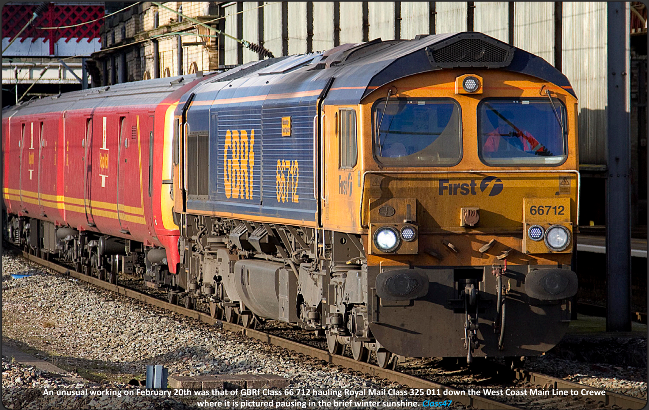
An unusual working on February 20th was that of GBRf Class 66 712 hauling Royal Mail Class 325 011 down the West Coast Main Line to Crewe where it is pictured pausing in the brief winter sunshine. Class47