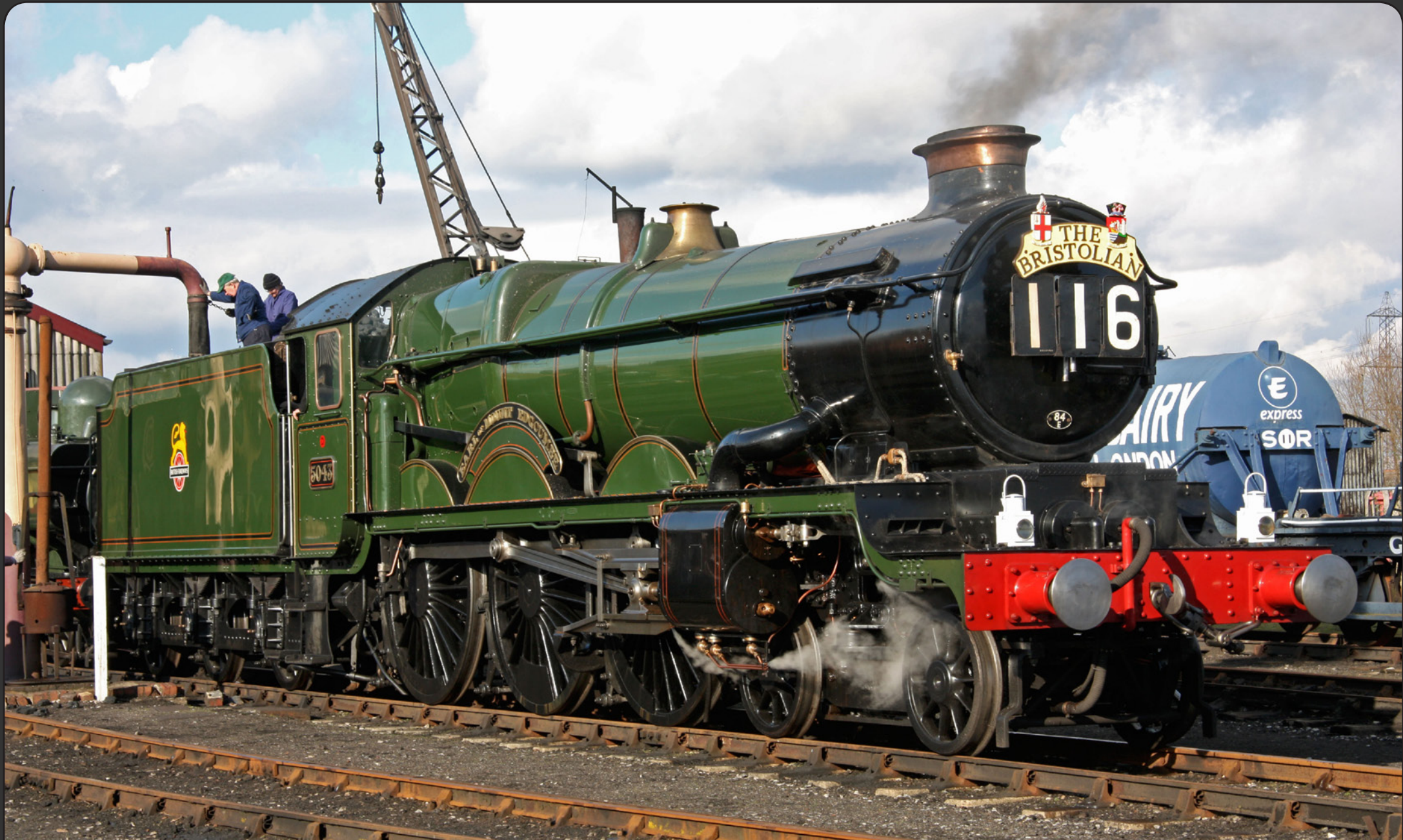
THE GREAT WESTERN INCURSION featured Great Western 4-6-0 "Hall" Class No. 4965 "Rood Ashton Hall" and Great Western "Castle" Class No. 5043 "Earl of Mount Edgcumbe" from Birmingham Snow Hill to Didcot on February 20th. Here 5043 is seen being watered at Didcot. Phil Martin