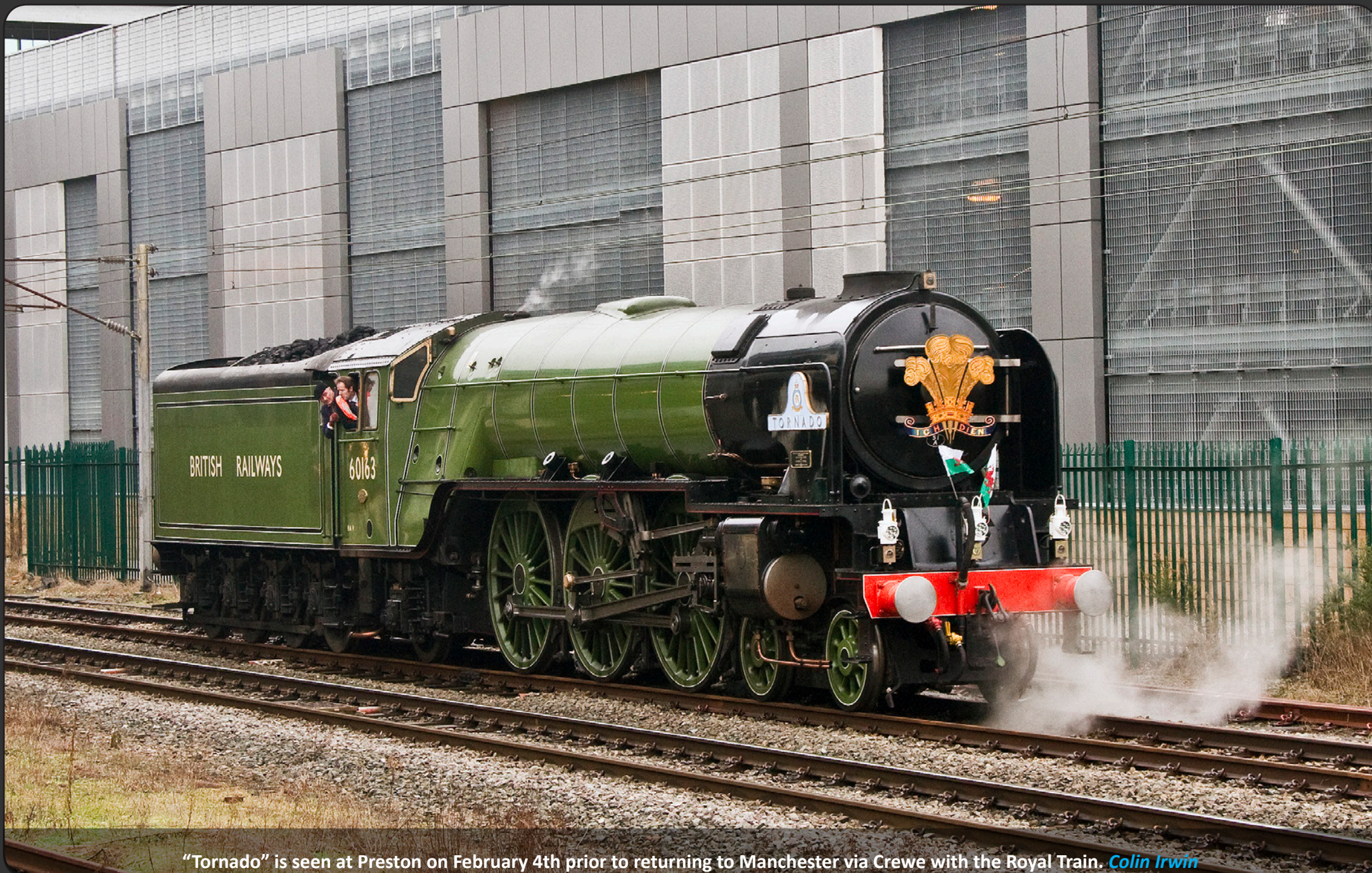
"Tornado" is seen at Preston on February 4th prior to returning to Manchester via Crewe with the Royal Train.