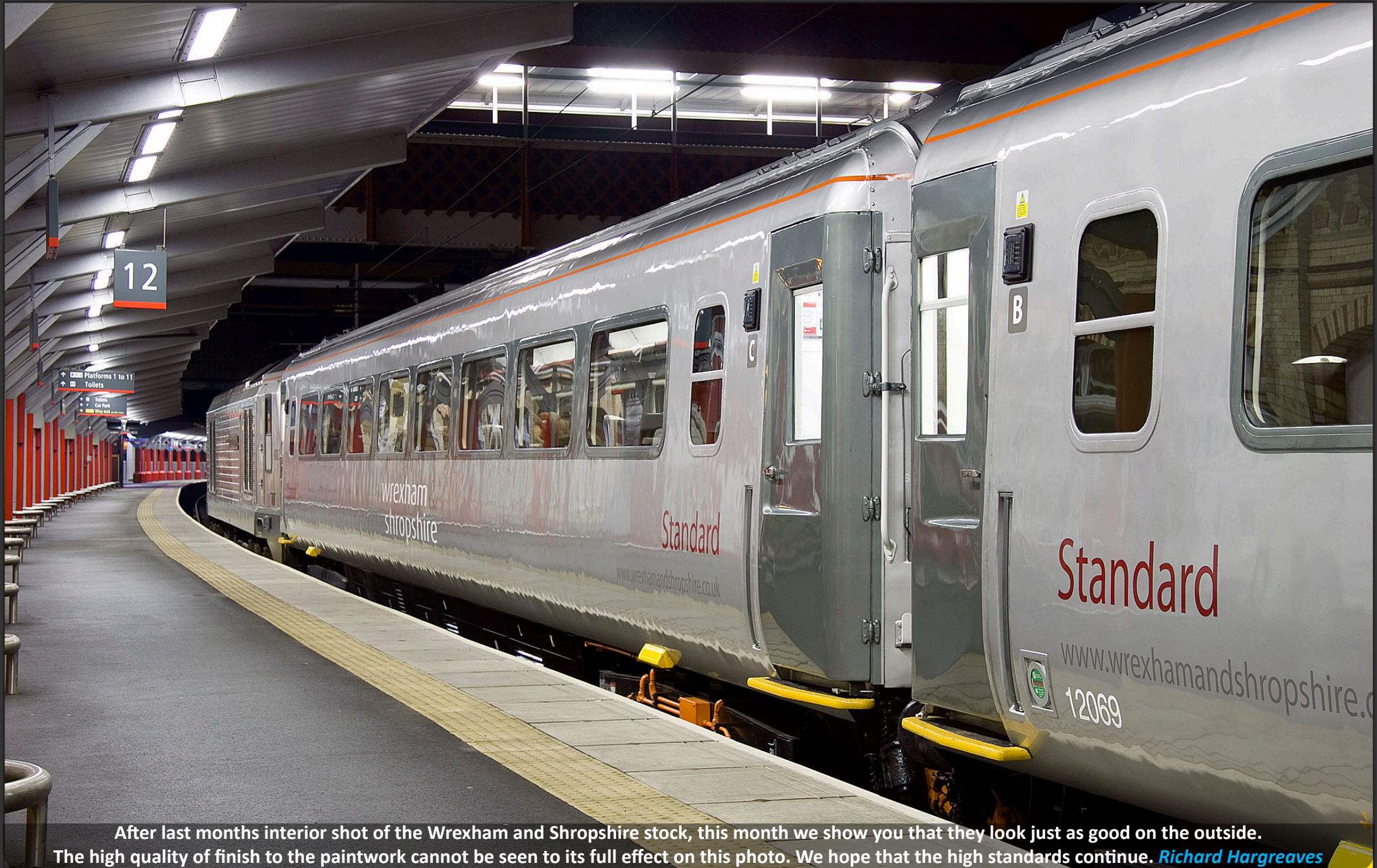
After last months interior shot of the Wrexham and Shropshire stock, this month we show you that they look just as good on the outside. The high quality of finish to the paintwork cannot be seen to its full effect on this photo. We hope that the high standards continue. Richard Hargreaves