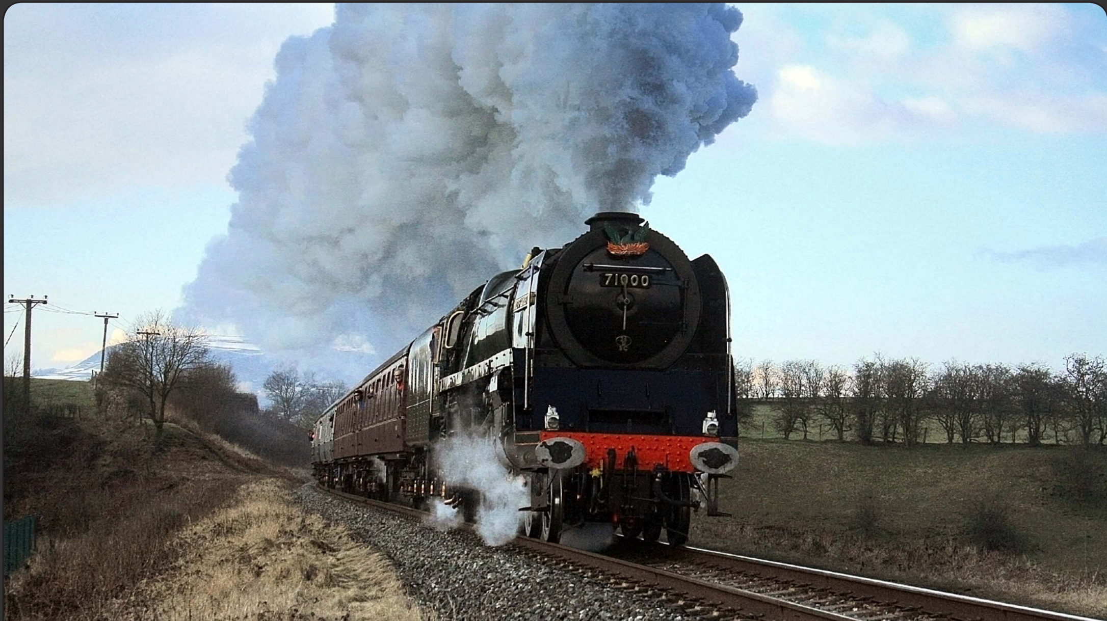
BR 8P No. 71000 "Duke Of Gloucester" powers through Burrs Country Park with a service from Rawtenstall to Heywood. The 8P is notorious for unreliability as it was originally an experimentally high powered locomotive produced by BR in the 1950s for express passenger trains, but the design failed to take off, and the Duke remained unique since the day she was built. On that weekend she had just returned to traffic following a long period in the works at Bury receiving an intermediate overhaul.