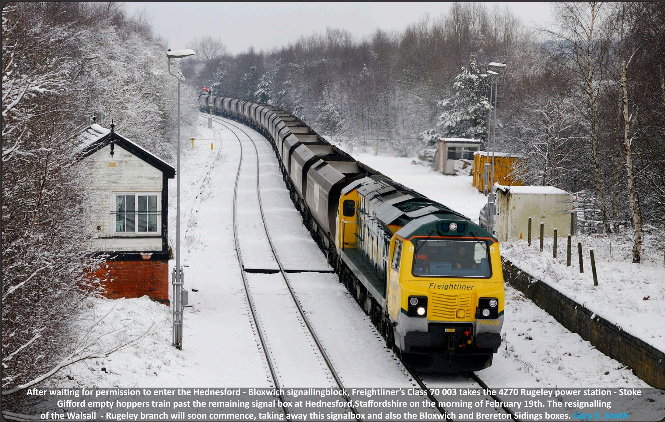
After waiting for permission to enter the Hednesford - Bloxwich signallingblock, Freightliner's Class 70 003 takes the 4270 Rugeley power station - Stoke Gifford empty hoppers train past the remaining signal box at Hednesford,Staffordshire on the morning of February 19th. The resignalling of the Walsall - Rugeley branch will soon commence, taking away this signalbox and also the Bloxwich and Brereton Sidings boxes.