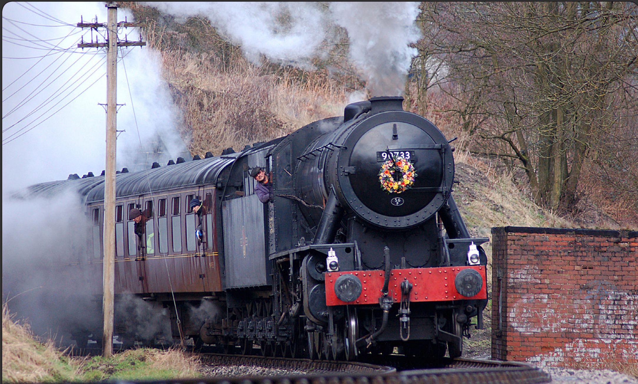
Keighley and Worth Valley Railway on February 13th and War Department 2-8-0 locomotive No. 90733 is approaching Keighley.