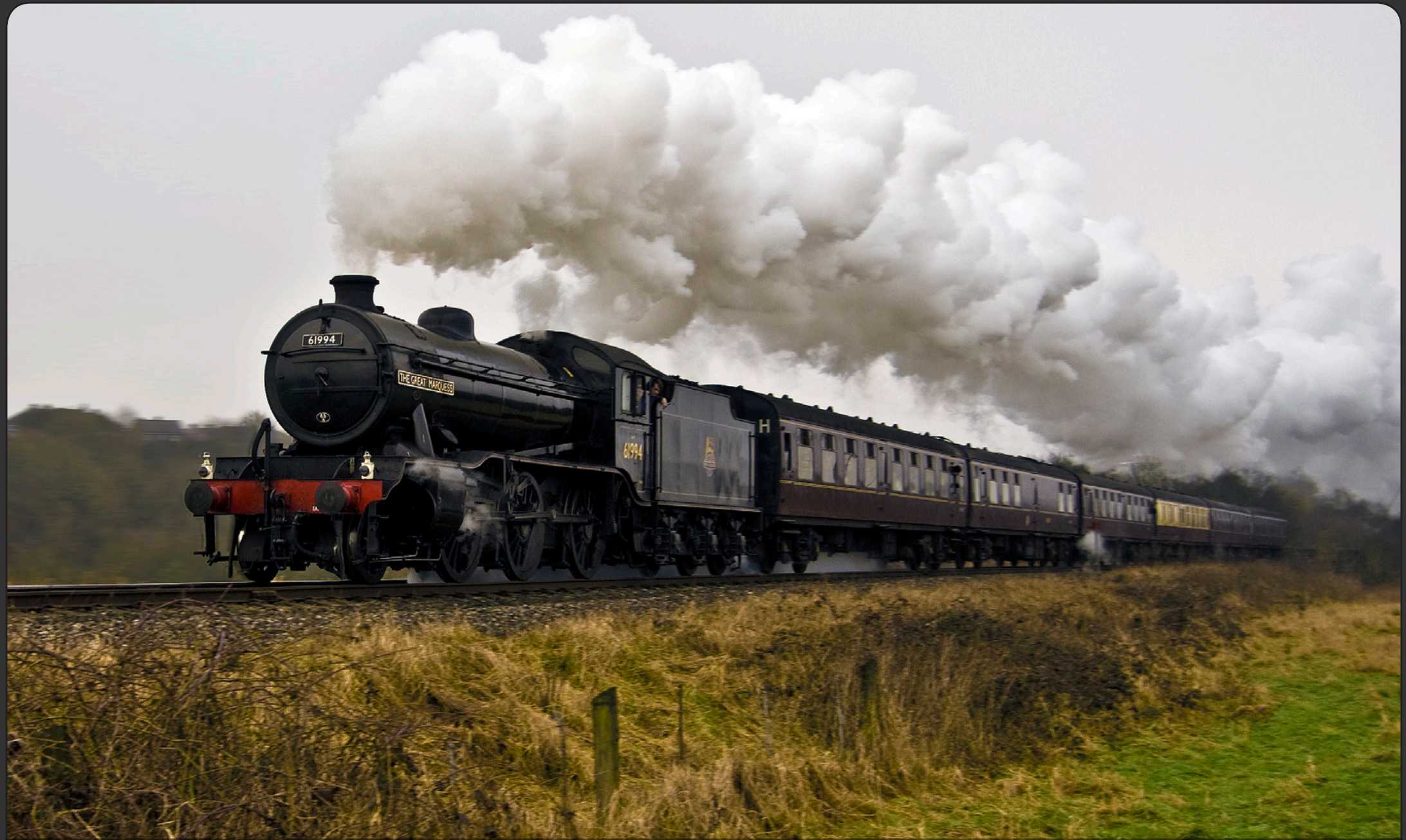
No. 61994 "The Great Marquess" on her final run of the day storms through Burrs Park, during the East Lancashire Railway's BR Gala on January 23rd.