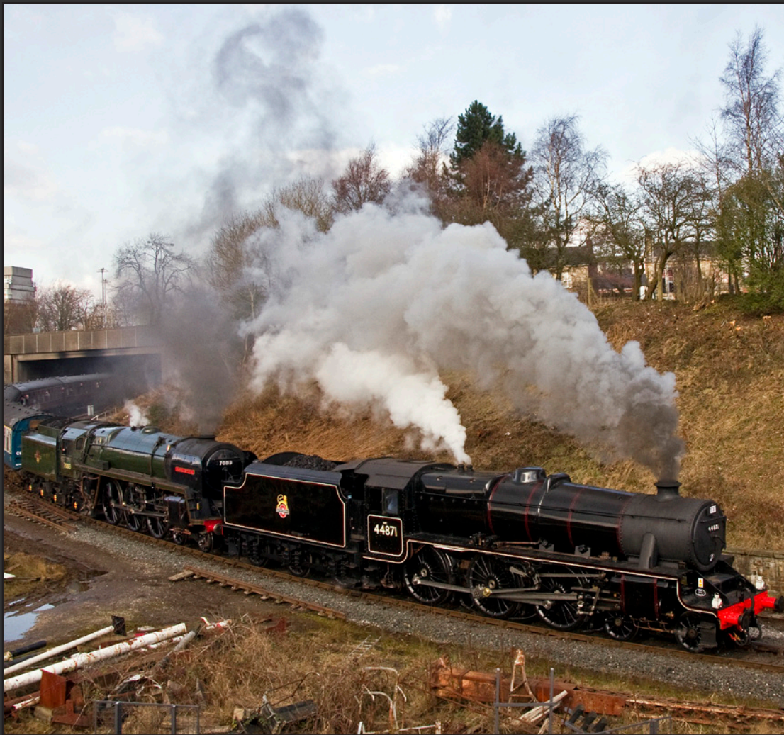
LMS 4-6-0 Black 5 No. 44871 and BR Standard Britannia Class 4-6-2 No. 70013 "Oliver Cromwell" depart Bury heading for Heywood recreating the "15 Guinee Special" on February 20th.