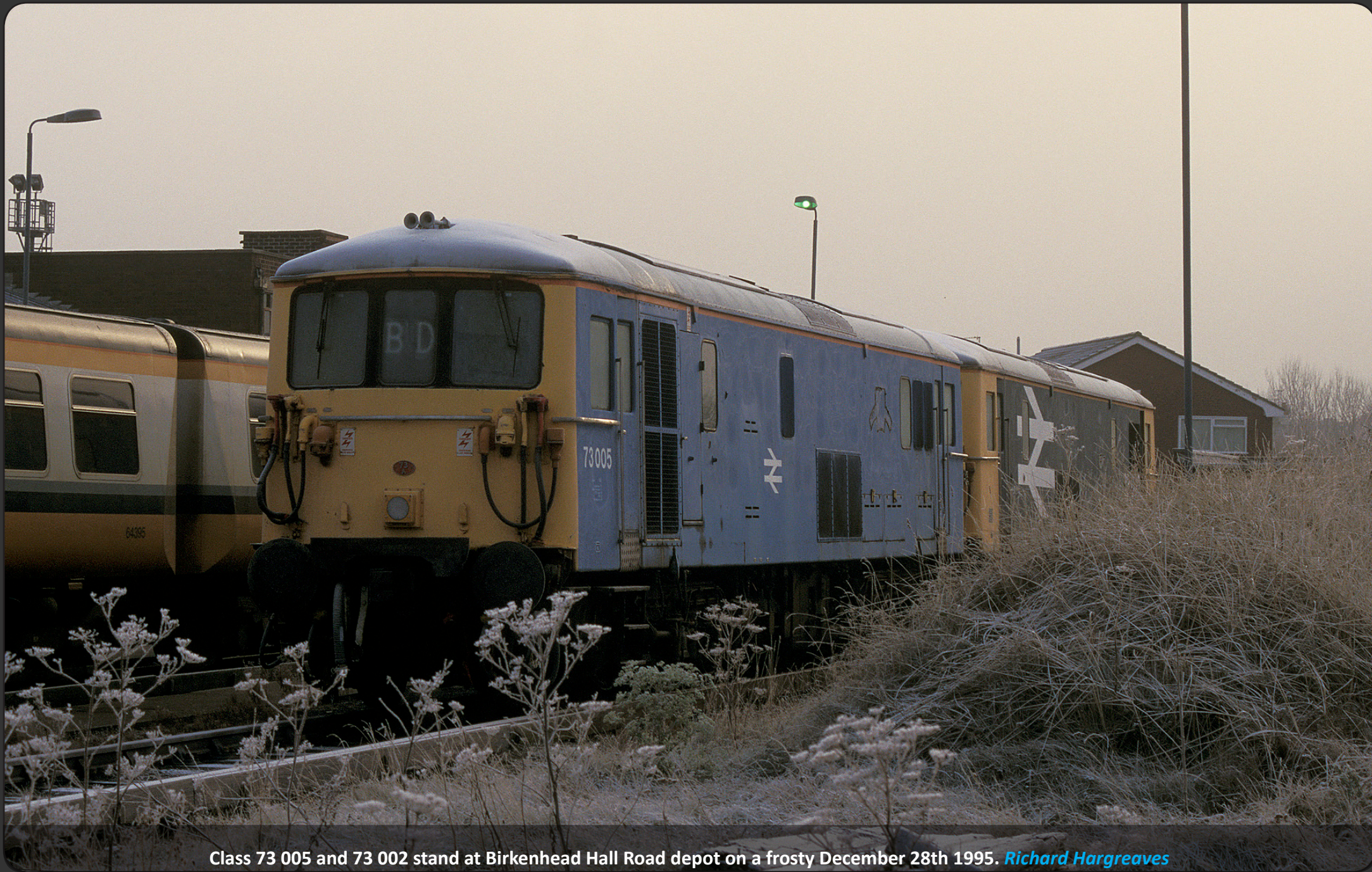
Class 73 005 and 73 002 stand at Birkenhead Hall Road depot on a frosty December 28th 1995. Richard Hargreaves