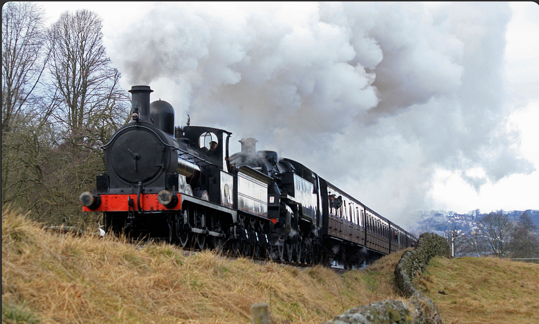
L&YR Class 25 Ironclad 0-6-0 No. 957 and BR Standard 4 2-6-4 T No. 80002, having just departed from Haworth head for Oxenhope.