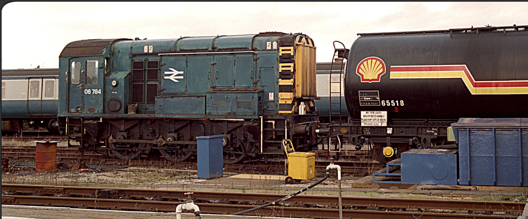
Top Left: Class 08 784 stands at Chester Depot in the company of a single Shell fuel tank in March 1988 Brian Battersby