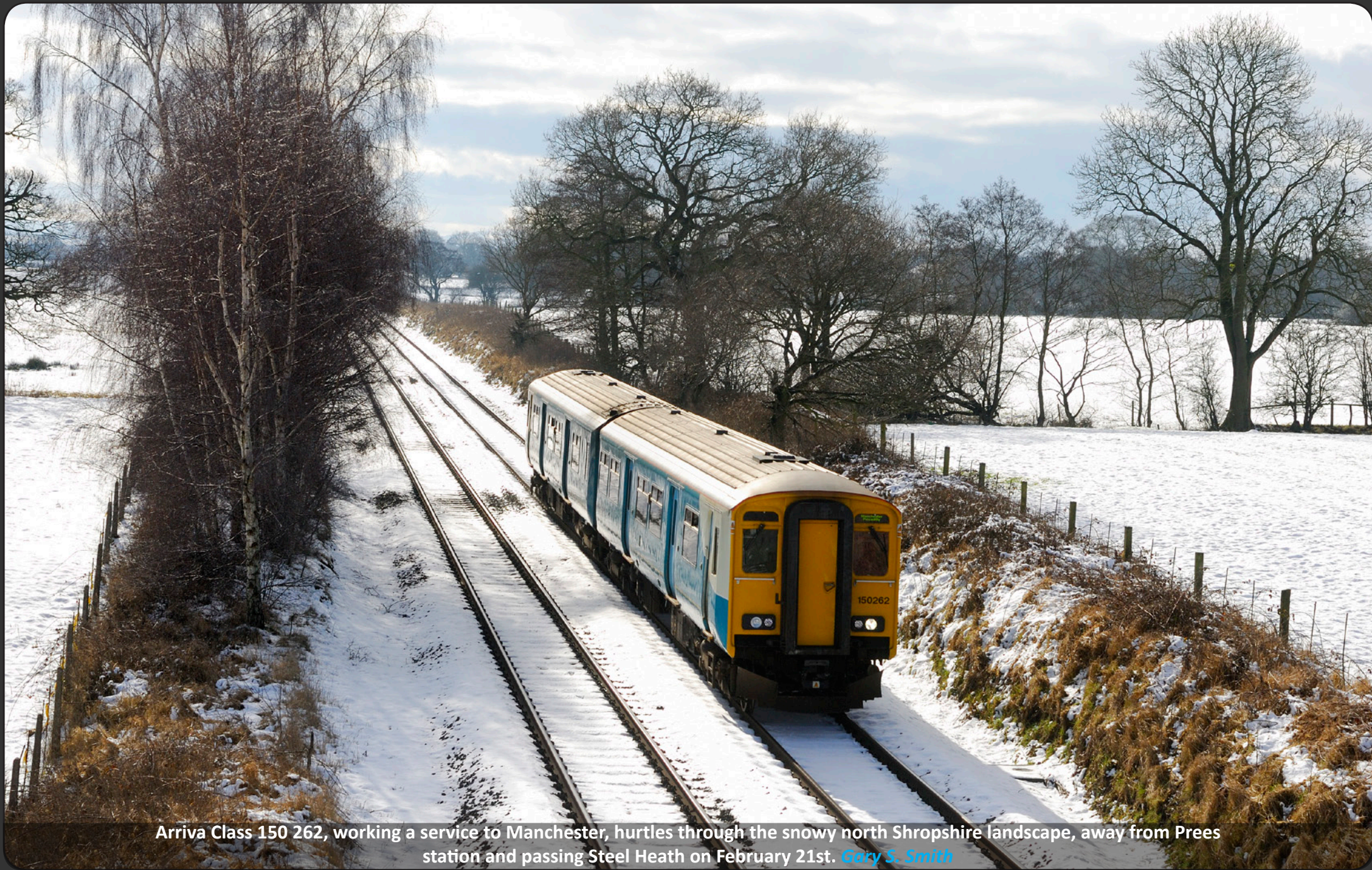
Arriva Class 150 262, working a service to Manchester, hurtles through the snowy north Shropshire landscape, away from Prees station and passing Steel Heath on February 21st.