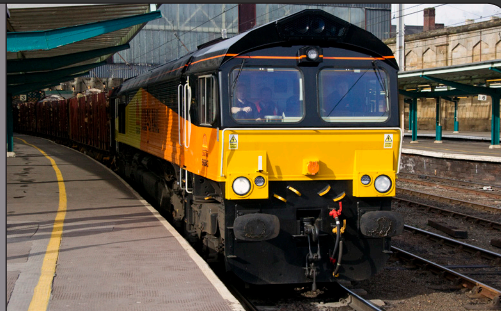
Top Right: Colas Class 66 843 is seen working 6J37 Carlisle Yard - Chirk timber train through Carlisle station on February 23rd. Colin Irwin