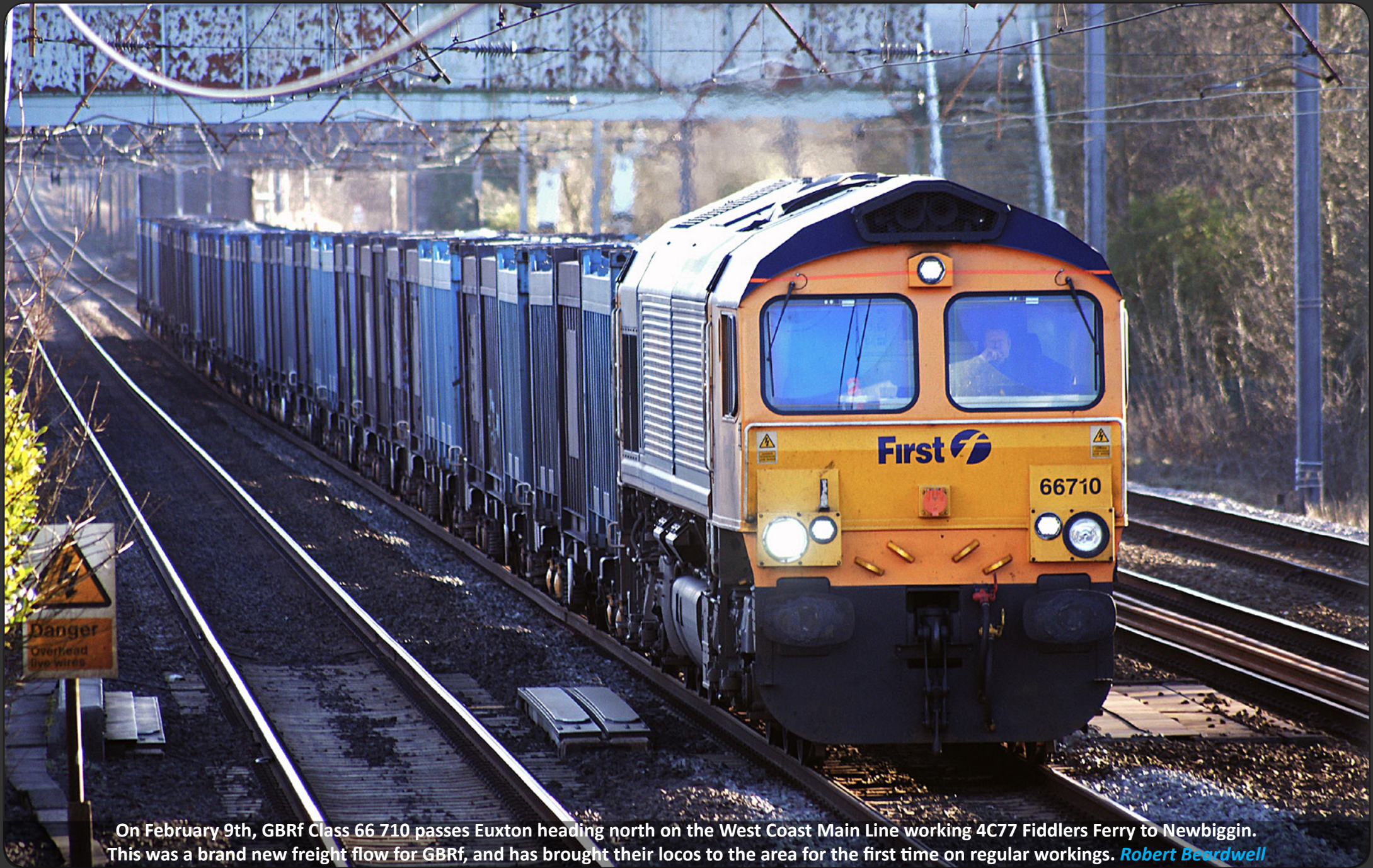
On February 9th, GBRf Class 66 710 passes Euxton heading north on the West Coast Main Line working 4C77 Fiddlers Ferry to Newbiggin. This was a brand new freight flow for GBRf, and has brought their locos to the area for the first time on regular workings.