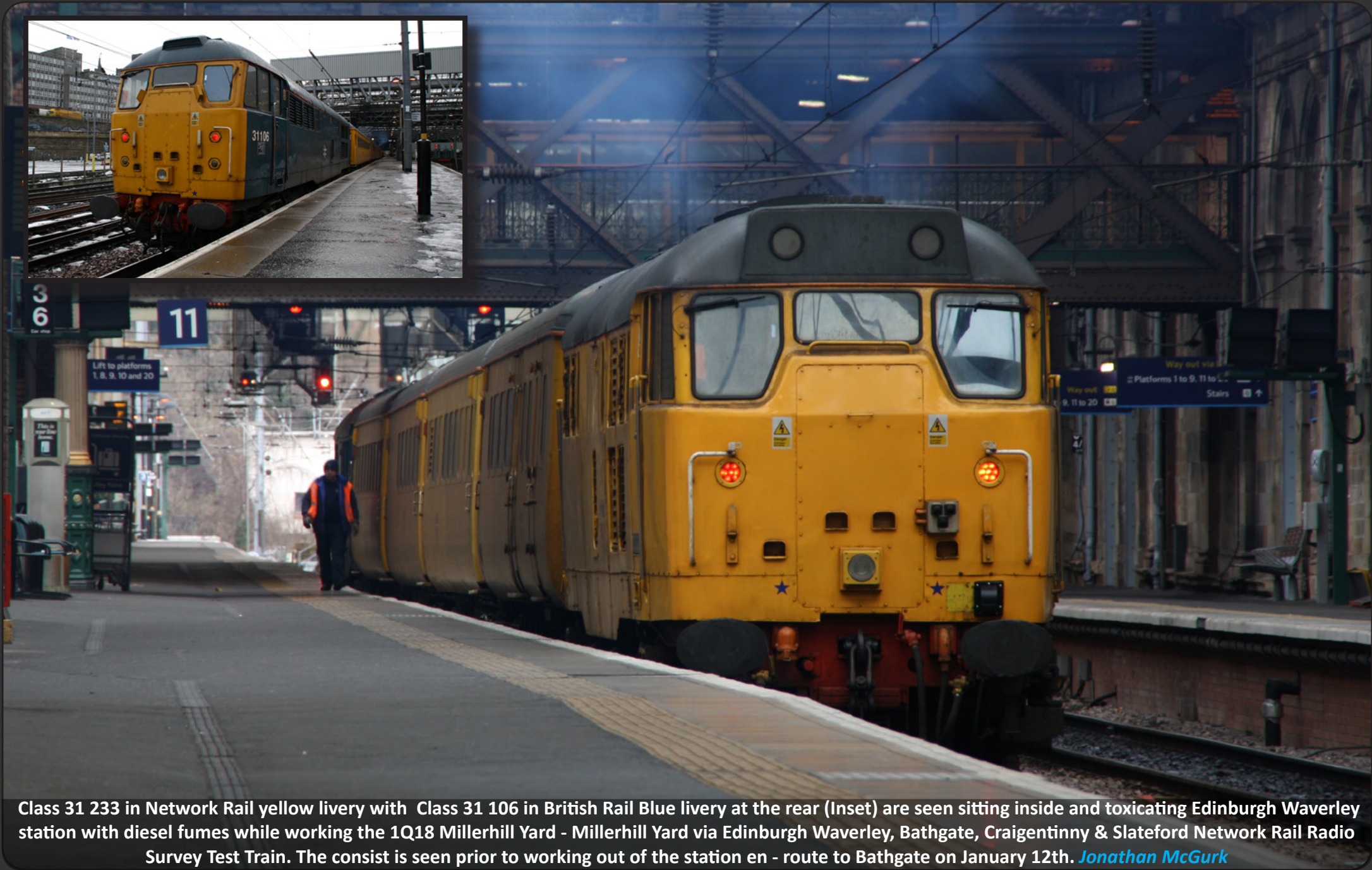
Class 31 233 in Network Rail yellow livery with Class 31 106 in British Rail Blue livery at the rear (Inset) are seen sitting inside and toxicating Edinburgh Waverley station with diesel fumes while working the 1Q18 Millerhill Yard - Millerhill Yard via Edinburgh Waverley, Bathgate, Craightinny & Slateford Network Rail Radio Survey Test Train. The consist is seen prior to working out of the station en - route to Bathgate on January 12th. Jonathan McGurk