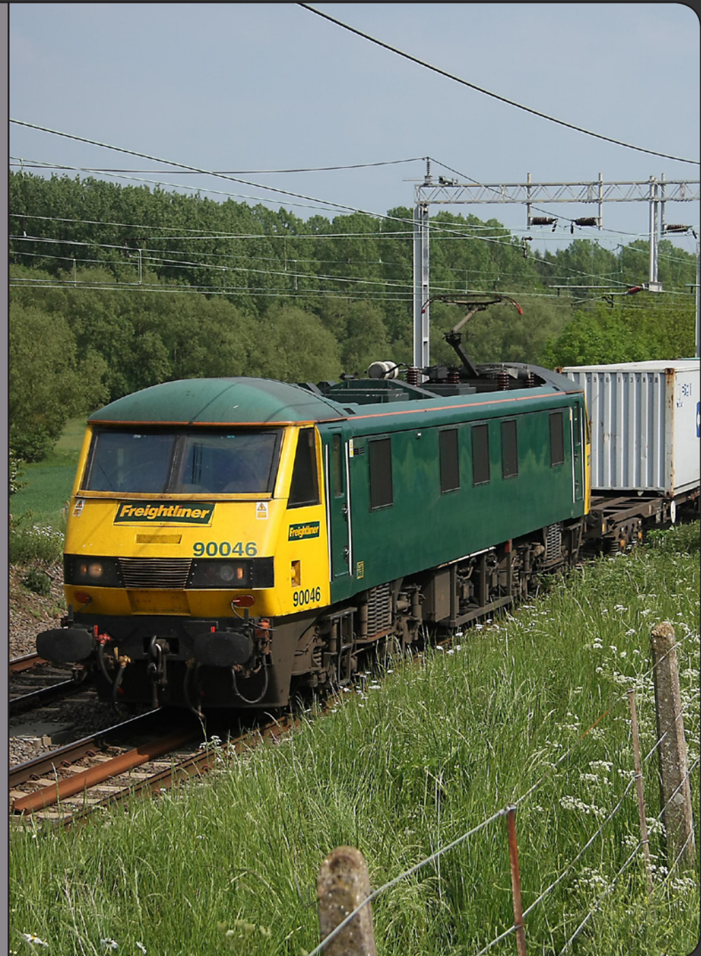
Right: Unbranded Class 90 046 heads 4M88 Felixtowe to Coatbridge liner passing Chapel Brampton, on June 6th. Derek Elston