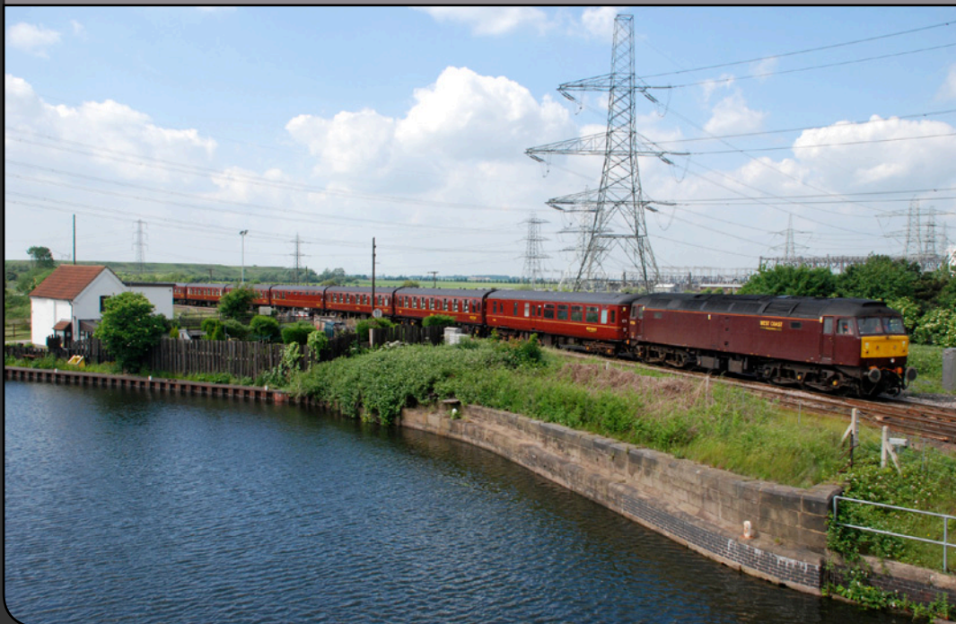
Below: Class 66 056 is in charge of 1259 Holyhead to Carmarthen, The Heart of Wales Scenic Rambler, as it passes Burgs Lane, Bayston Hill with 66 090 was on the back, June 5th.