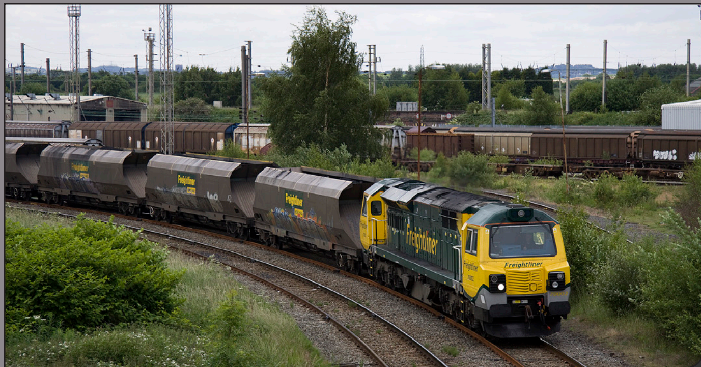
Bottom Right: Freightliner's Class 70 002 departs Warrington Arpley on June 19th heading for Fiddlers Ferry Power Station.