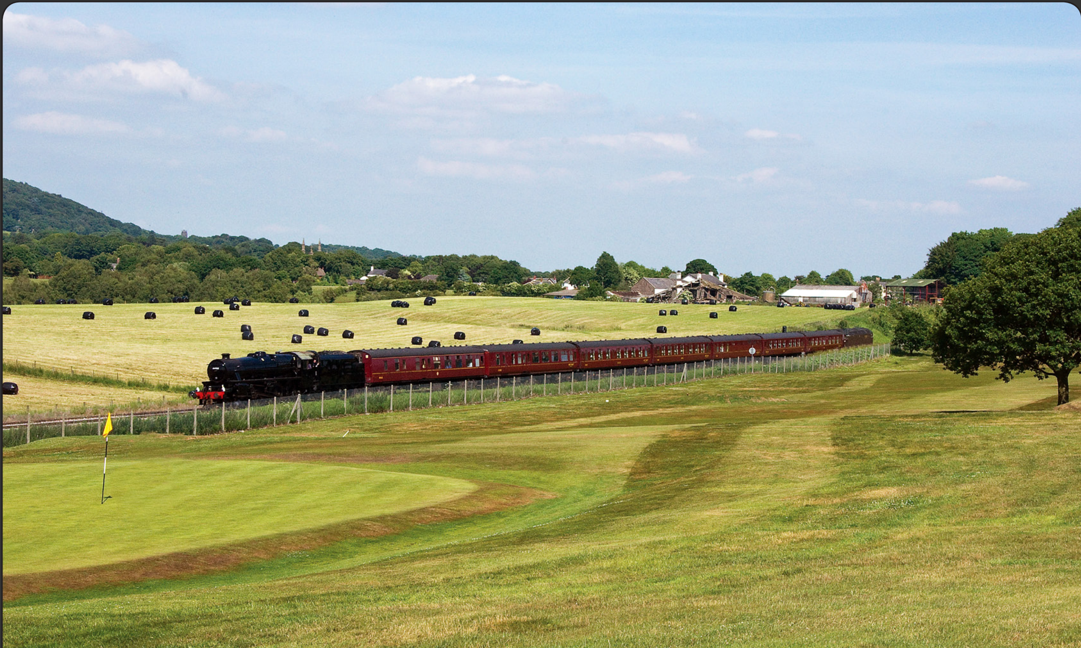
LMS 5MT Black 5 No. 44932 is seen on a test run from Carnforth - Hellifield - Preston - Carnforth passing Pleasington Golf Course on June 30th. Colin Irwin