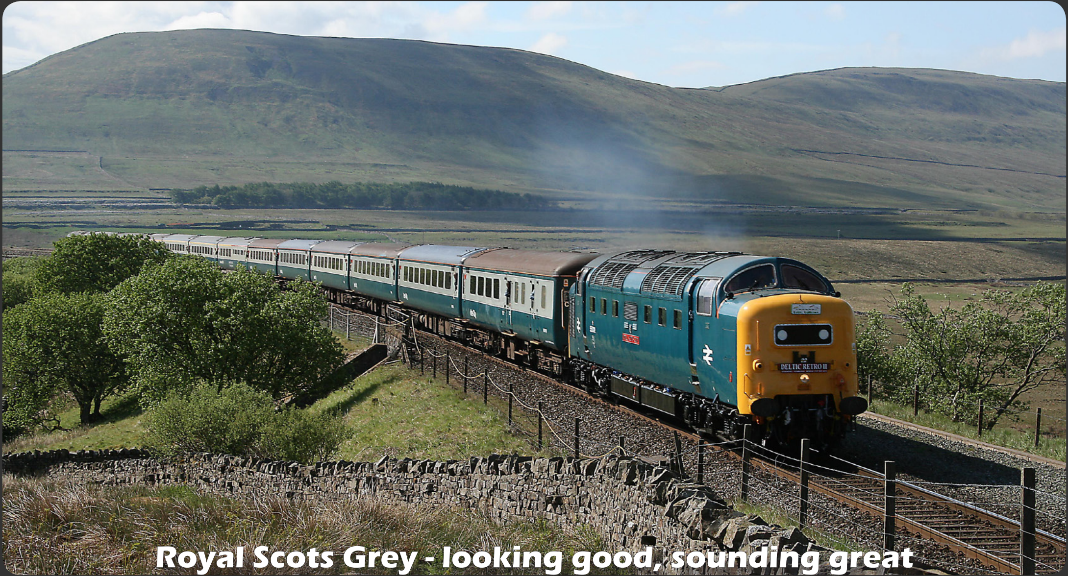
Royal Scots Grey - looking good, sounding great