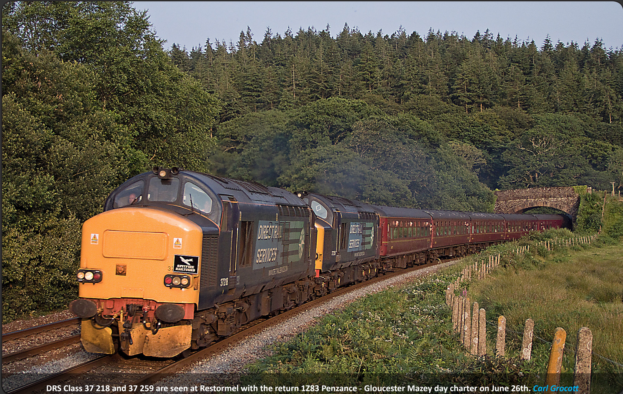
DRS Class 37 218 and 37 259 are seen at Restormel with the return 1283 Penzance - Gloucester Mazey day charter on June 26th. Carl Grocott