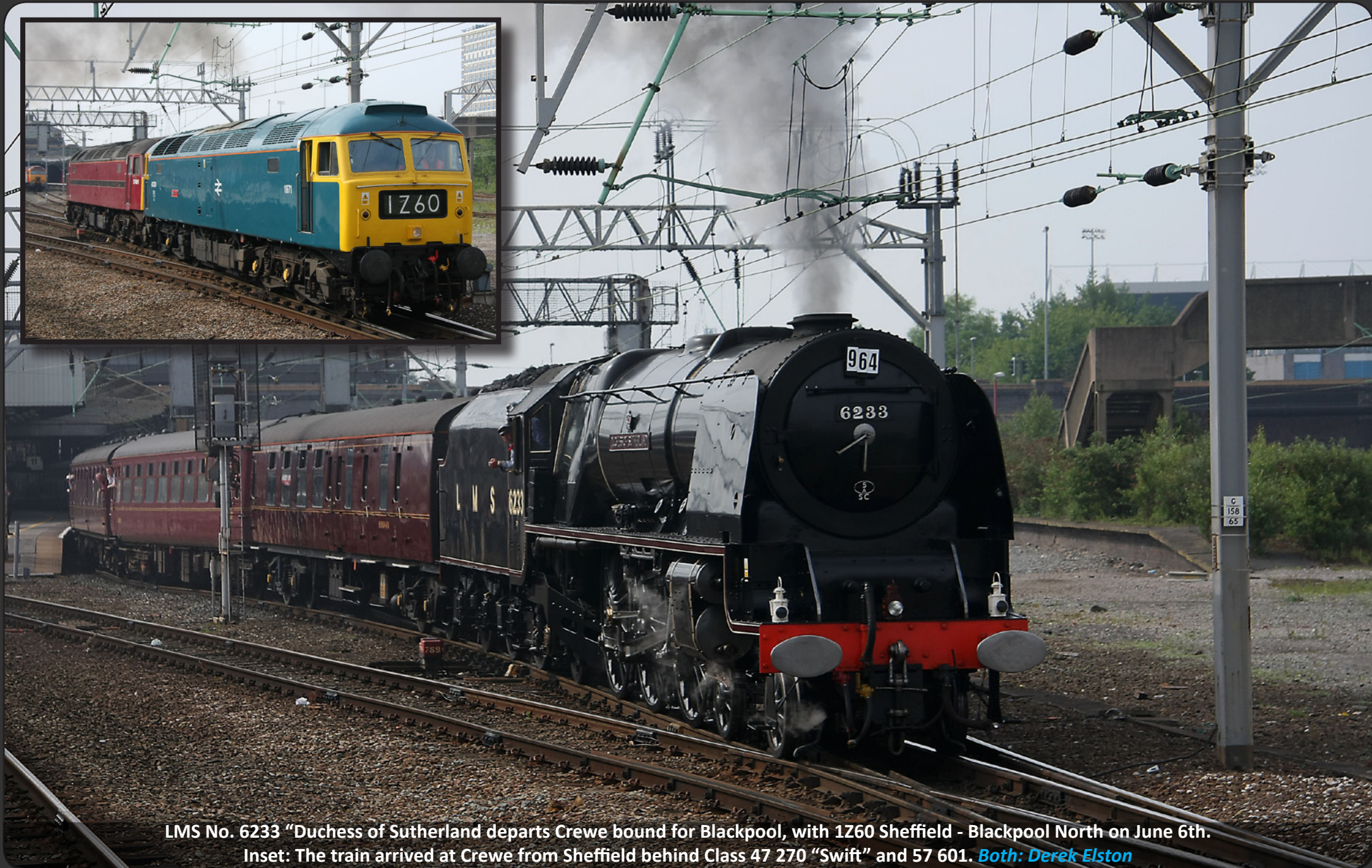
LMS No. 6233 "Duchess of Sutherland departs Crewe bound for Blackpool, with 1260 Sheffield - Blackpool North on June 6th. Inset: The train arrived at Crewe from Sheffield behind Class 47 270 "Swift" and 57 601.