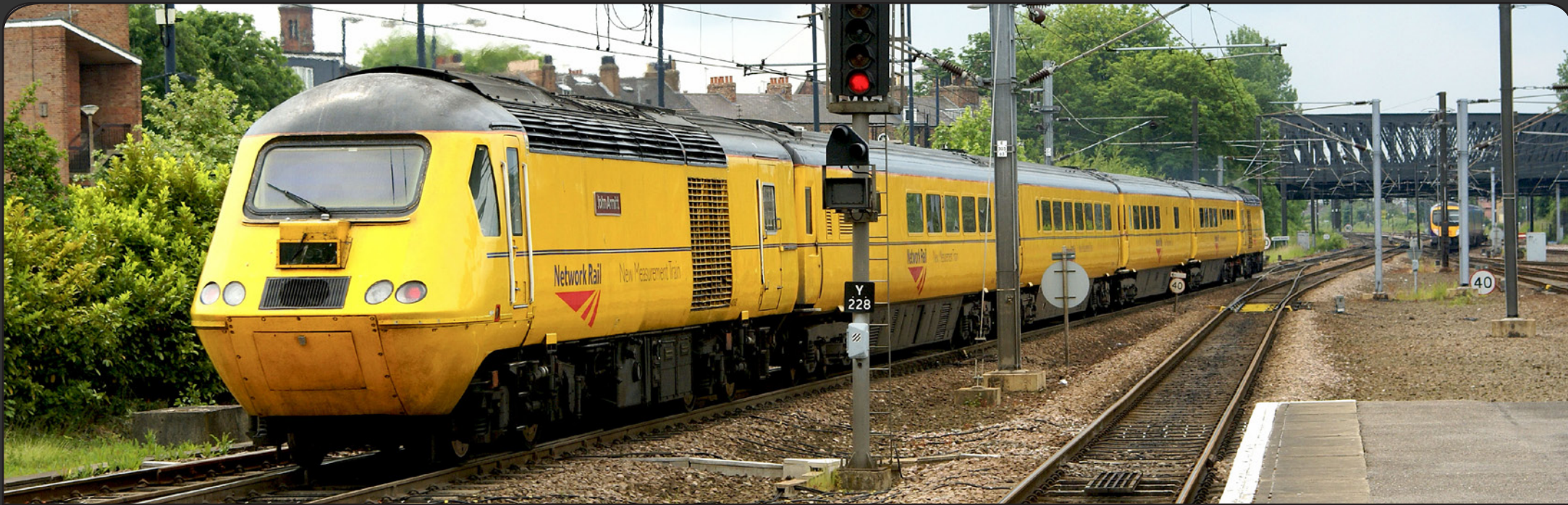
Above: Network Rail power car “John Armit” heads through York station on June 7th, heading for London.