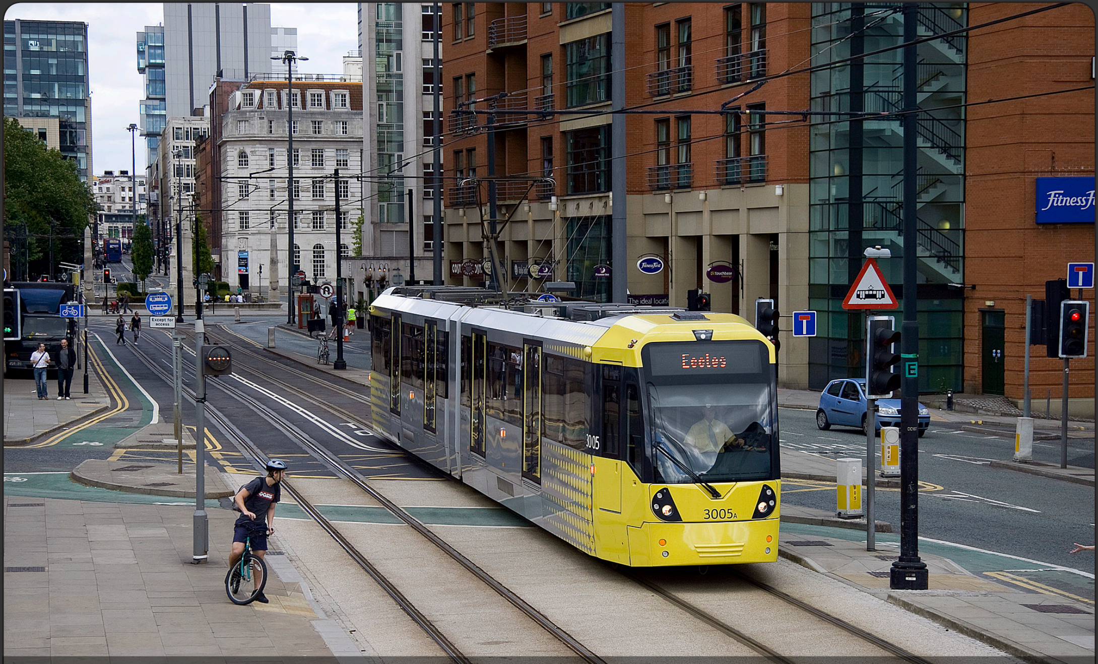
One of the latest batch of Manchester Metrolink trams heads for Eccles past the site of the old Manchester Central station on June 19th.