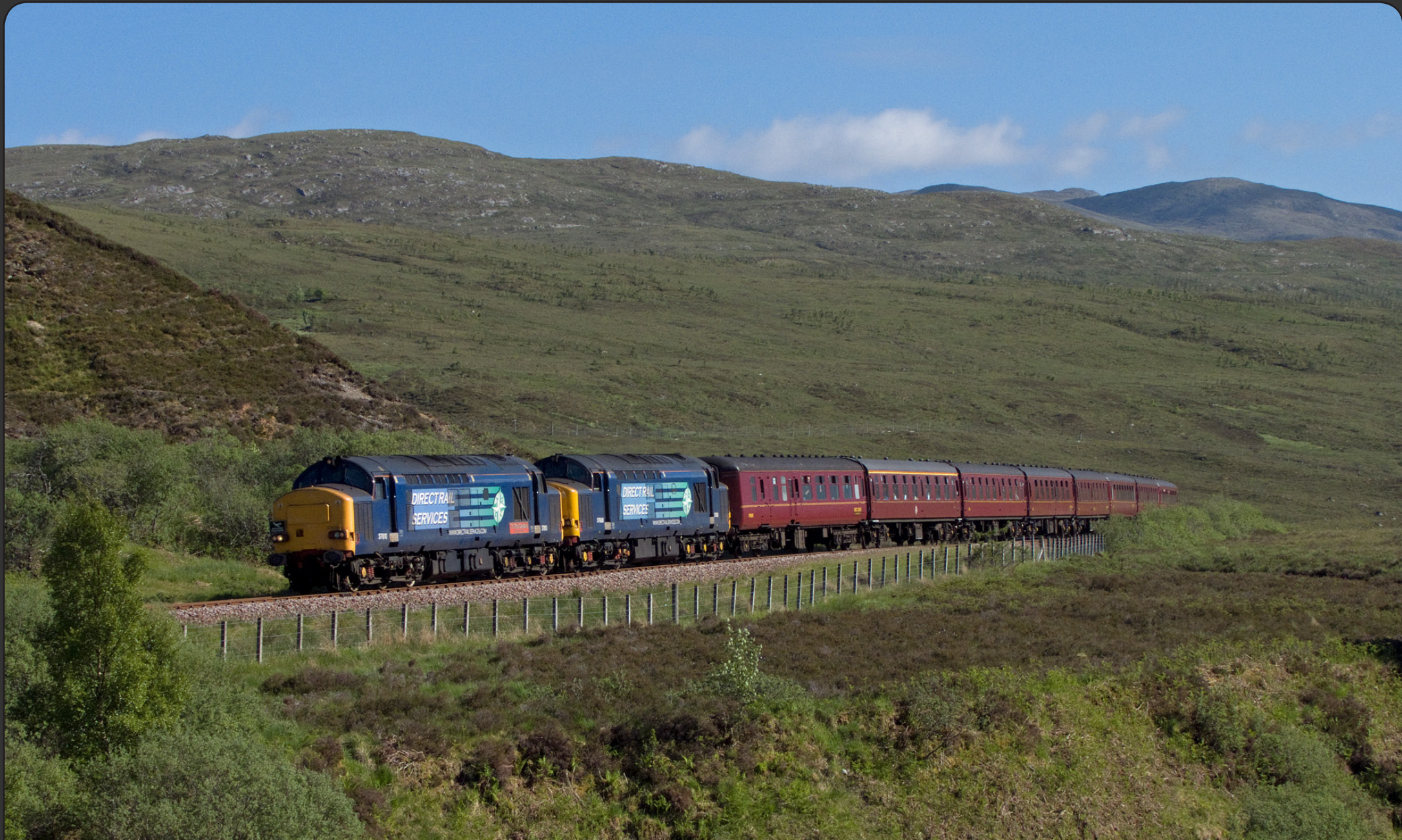
Spitfire's tour of Scotland from June 18th - 21st featured a pair of DRS Tractors. In this shot Class 37 610 and 37 608 are working 1Z38 Kyle - Inverness through Achnasheen on June 19th.