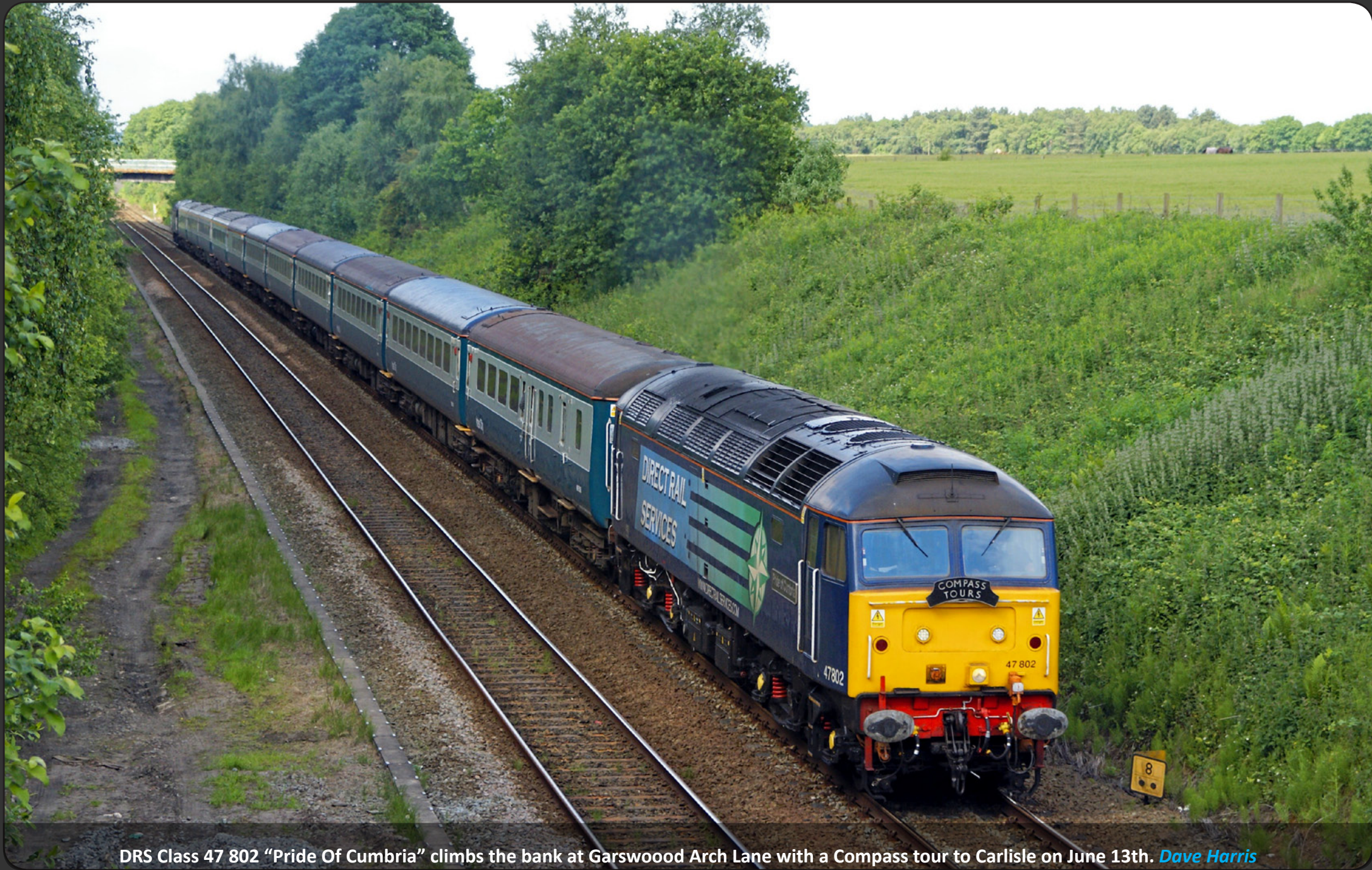
DRS Class 47 802 "Pride Of Cumbria" climbs the bank at Garswood Arch Lane with a Compass tour to Carlisle on June 13th.