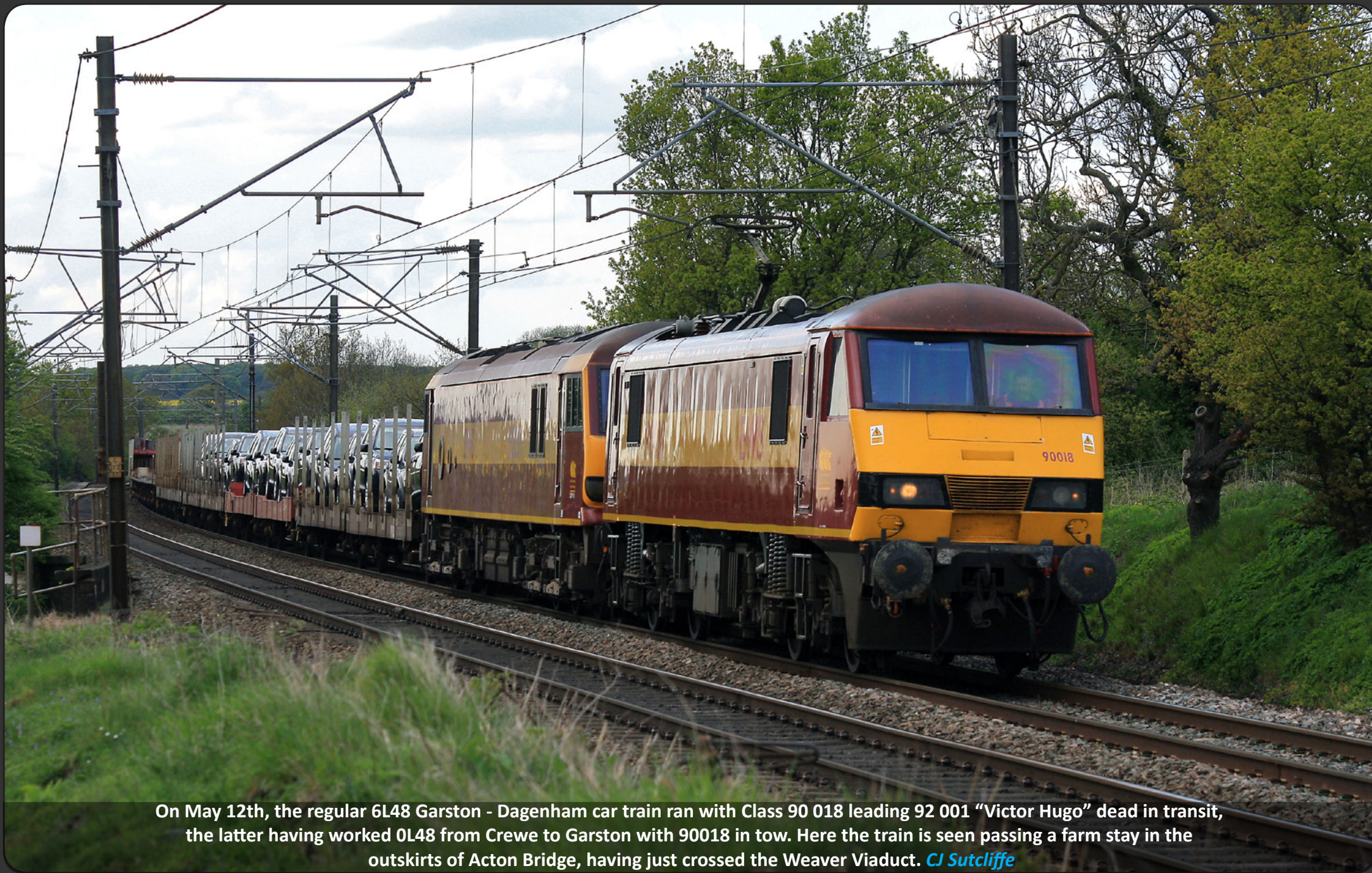
On May 12th, the regular 6L48 Garston - Dagenham car train ran with Class 90 018 leading 92 001 "Victor Hugo" dead in transit, the latter having worked 0L48 from Crewe to Garston with 90018 in tow. Here the train is seen passing a farm stay in the outskirts of Acton Bridge, having just crossed the Weaver Viaduct. CJ Sutcliffe