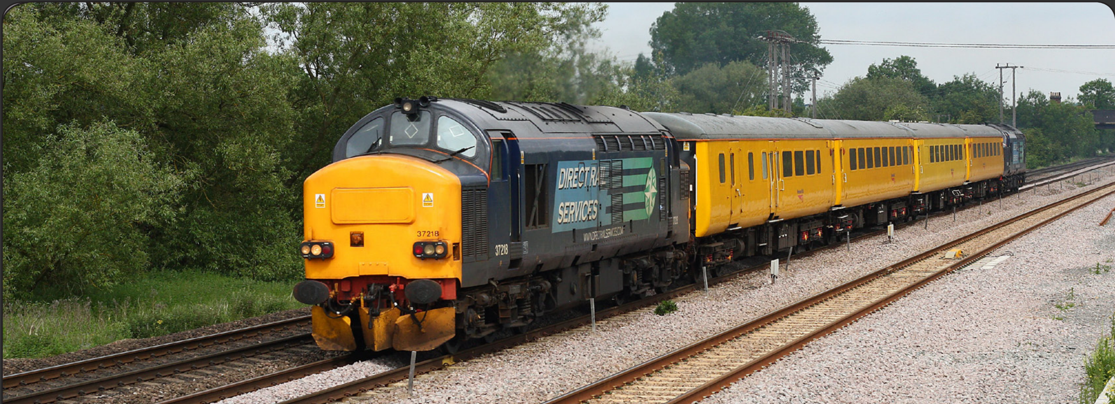
Above: DRS Class 37 218 and 37 259 T&T a Serco test train running as 1Q12 Derby RTC to Old Oak through Isham on June 7th.