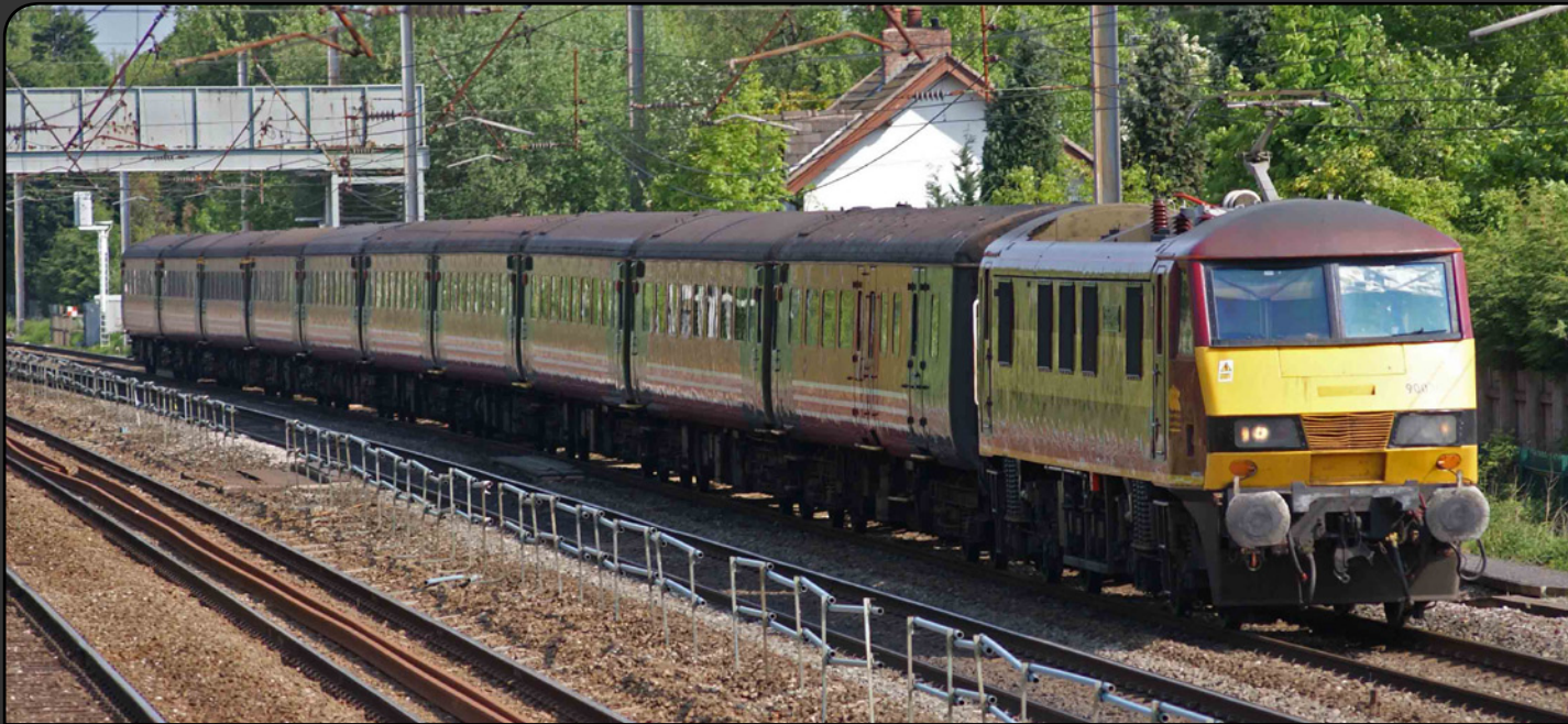
Left: Class 90 020 “Collingwood” heads the second of two “Footex” runs from Blackpool to Wembley (Changing From A Class 67 to a Class 90 at Preston) for the Football play-offs, seen here passing Euxton on May 22nd.