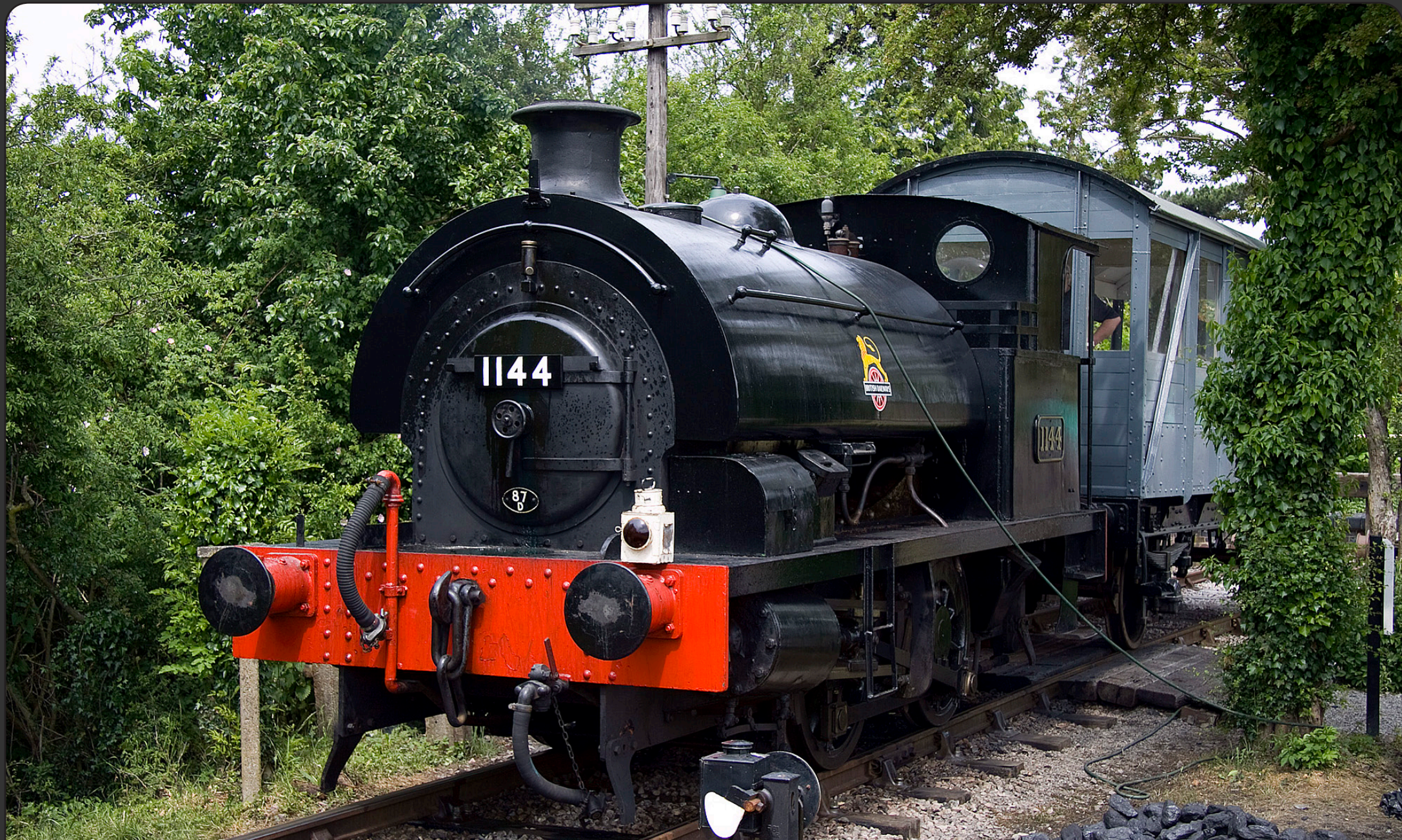
Last one from the Gloucester and Warwickshire's 175 event, the locomotive is a Robert Stephenson & Hawthorne 0-4-0ST (by courtesy of the Gwilli Railway) which is presented as GWR Swansea Harbour shunter No. 1144. This loco was giving trips along the short siding at Gotherington West.