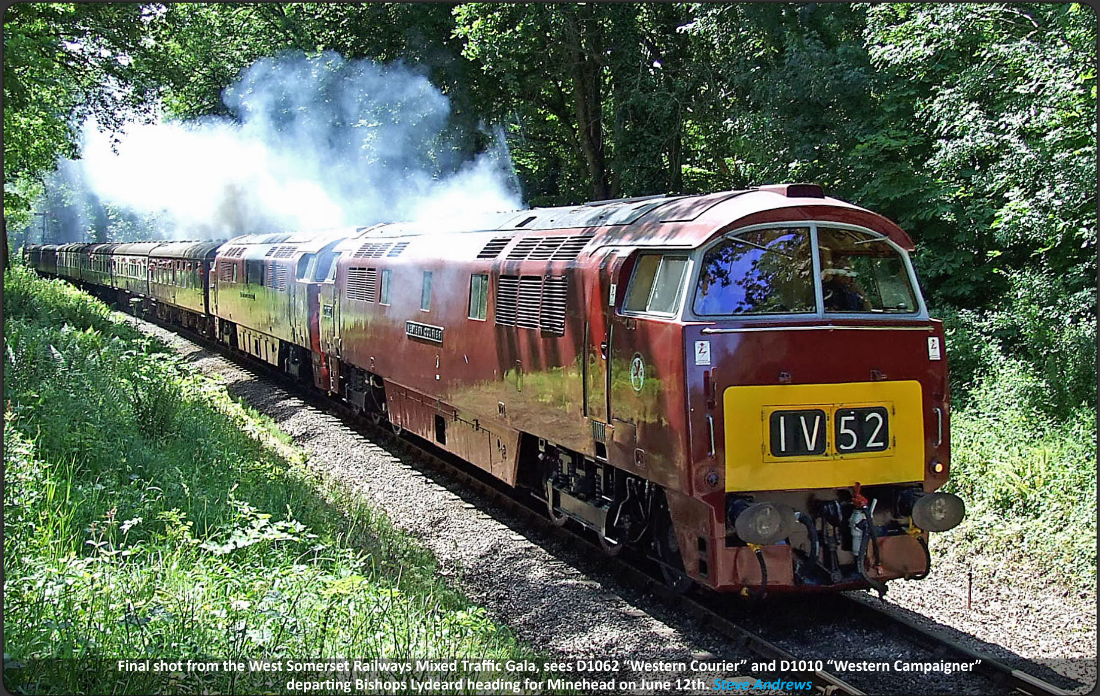
Final shot from the West Somerset Railways Mixed Traffic Gala, sees D1062 "Western Courier" and D1010 "Western Campaigner" departing Bishops Lydeard heading for Minehead on June 12th.