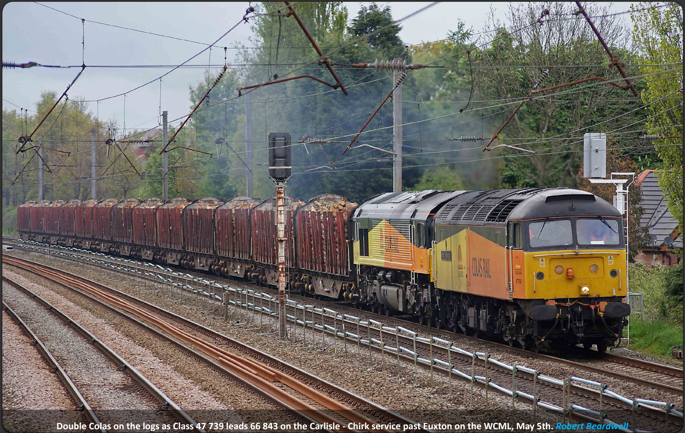
Double Colas on the logs as Class 47 739 leads 66 843 on the Carlisle - Chirk service past Euxton on the WCML, May 5th.