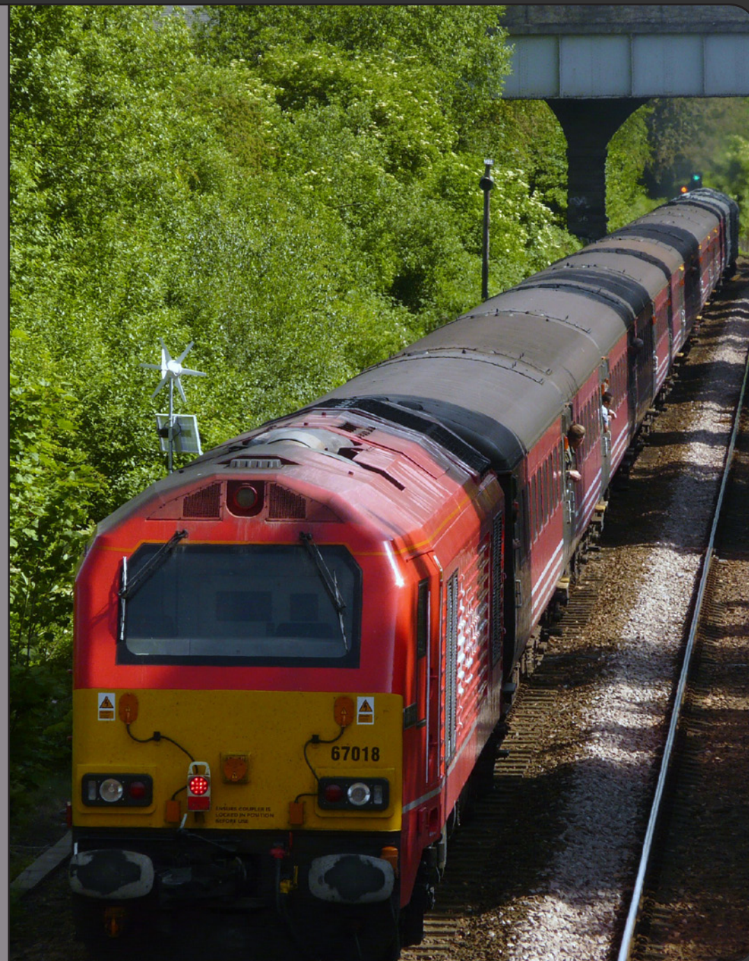
Right: DB Schenker liveried Class 67 018 brings up the rear on the same train, heading back to Nuneaton.