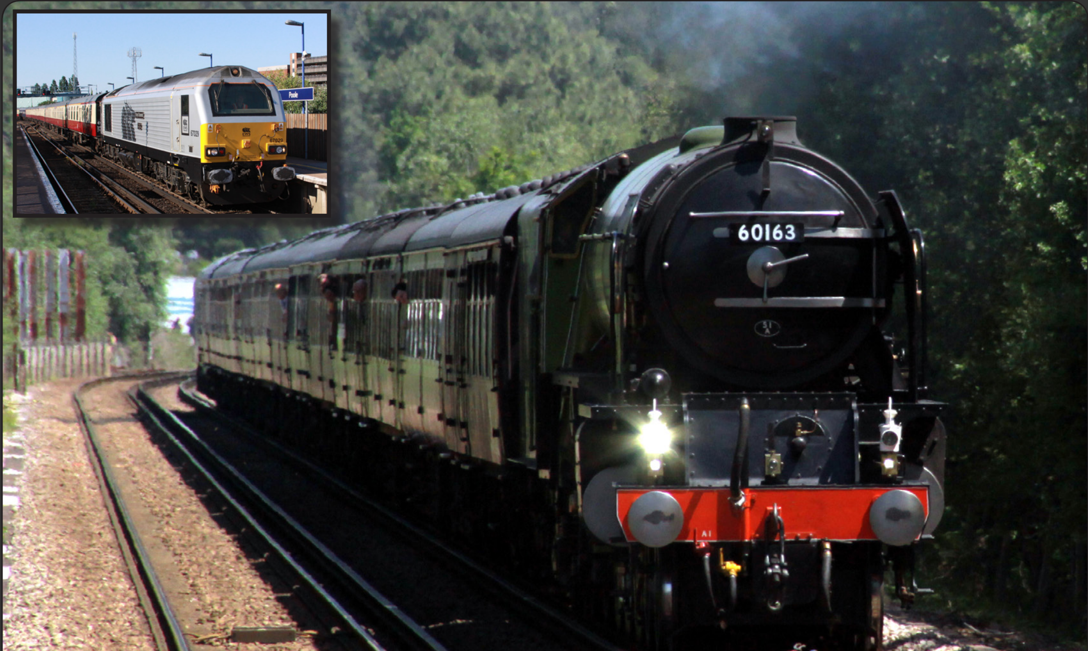
Main: On June 16th, A1 No. 60163 "Tornado" is seen working the 1282 Victoria to Swanage "Purbeck Tornado" approaching Holton Heath. Inset: The return working 1283 Swanage to Waterloo with Class 67 029 hauling Tornado at the rear, is seen at Poole station.