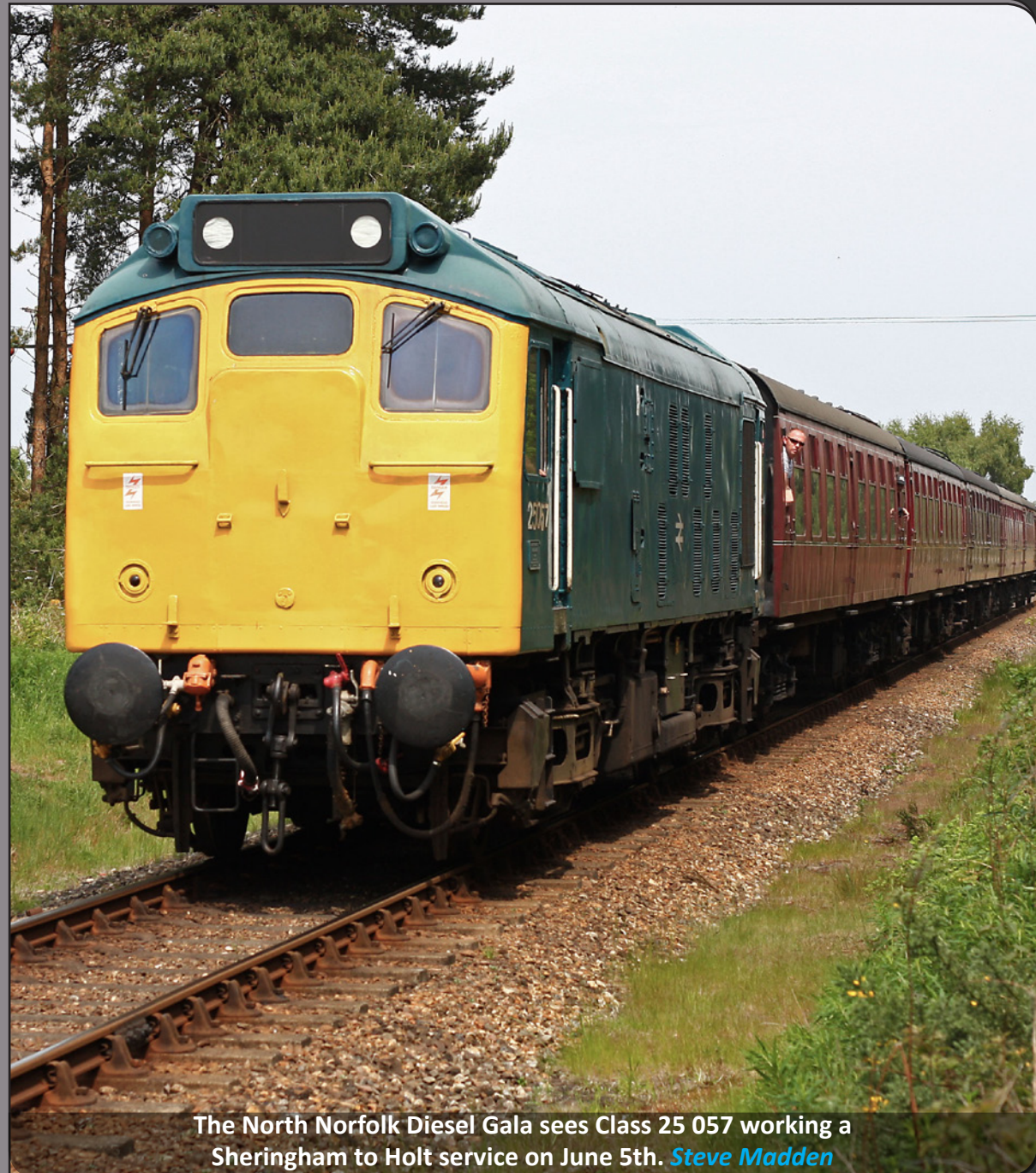
The North Norfolk Diesel Gala sees Class 25 057 working a Sheringham to Holt service on June 5th.

Current and past employees of the Royal Mail and anyone visiting the event with them will be entitled to discount tickets.