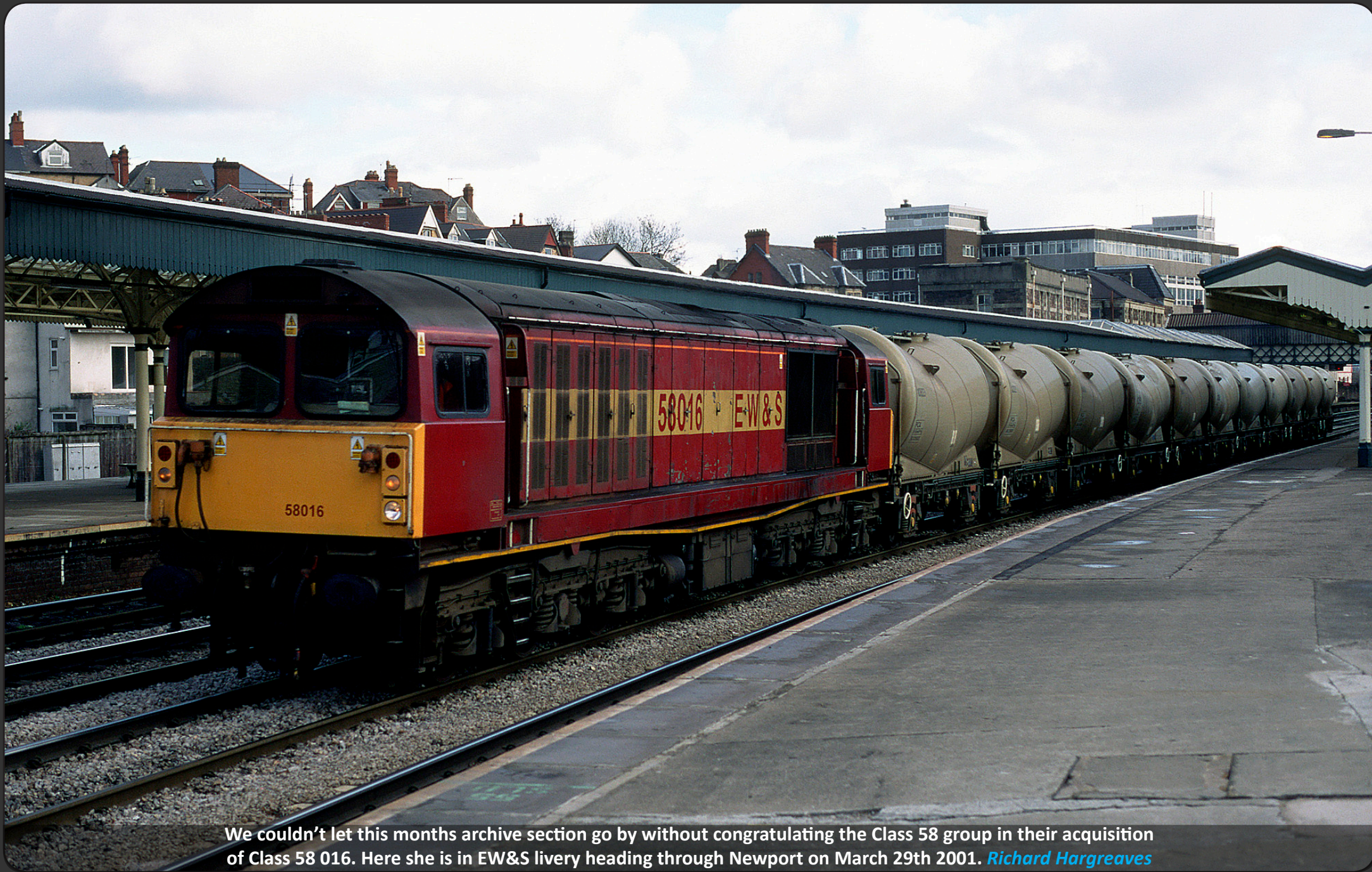
We couldn't let this month's archive section go by without congratulating the Class 58 group in their acquisition of Class 58 016. Here she is in EW&S livery heading through Newport on March 29th 2001.