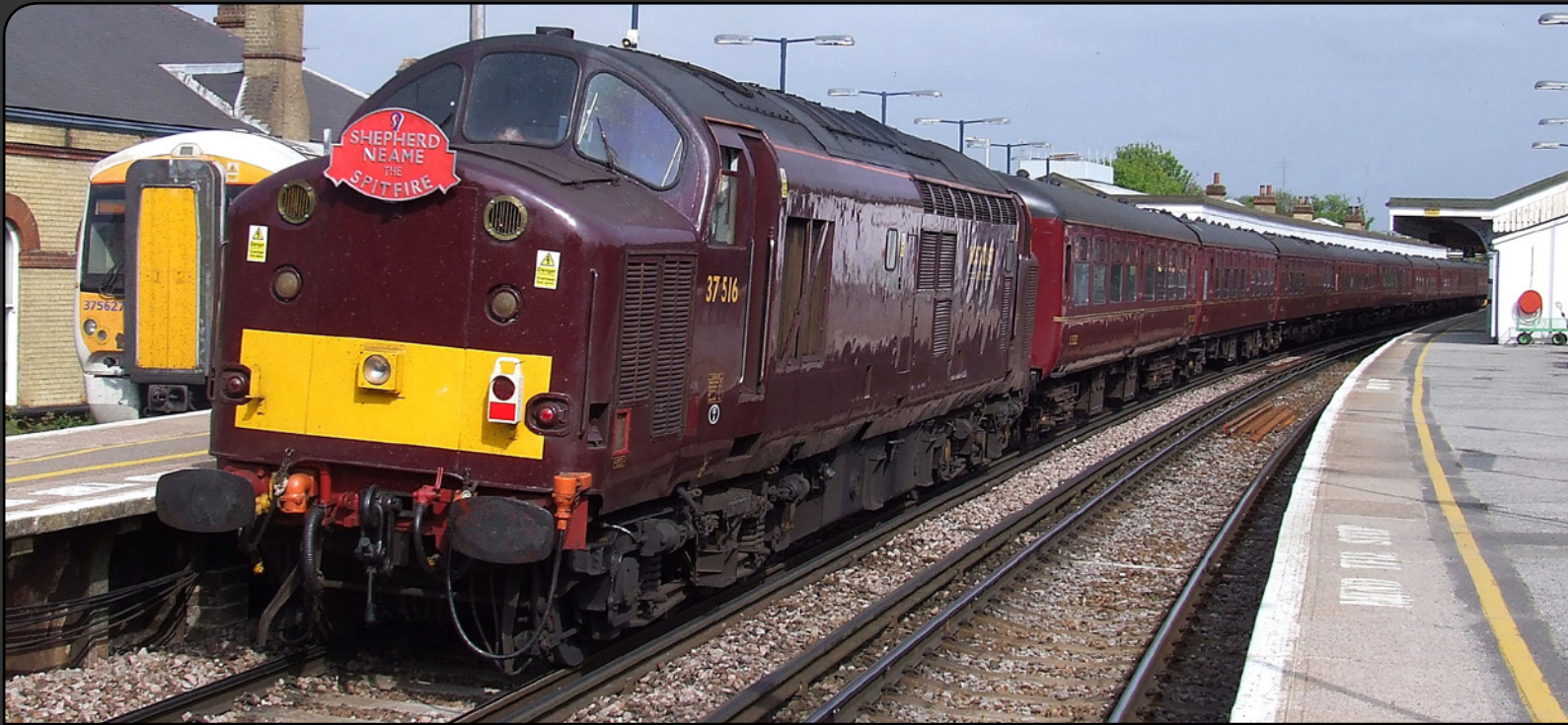
Top Left: On May 16th West Coast's Class 37 516 stands at Faversham, Kent, after trailing Shepherd Neame's "The Spitfire" Raitour from Sheerness. Class 37 706 was on the other end.