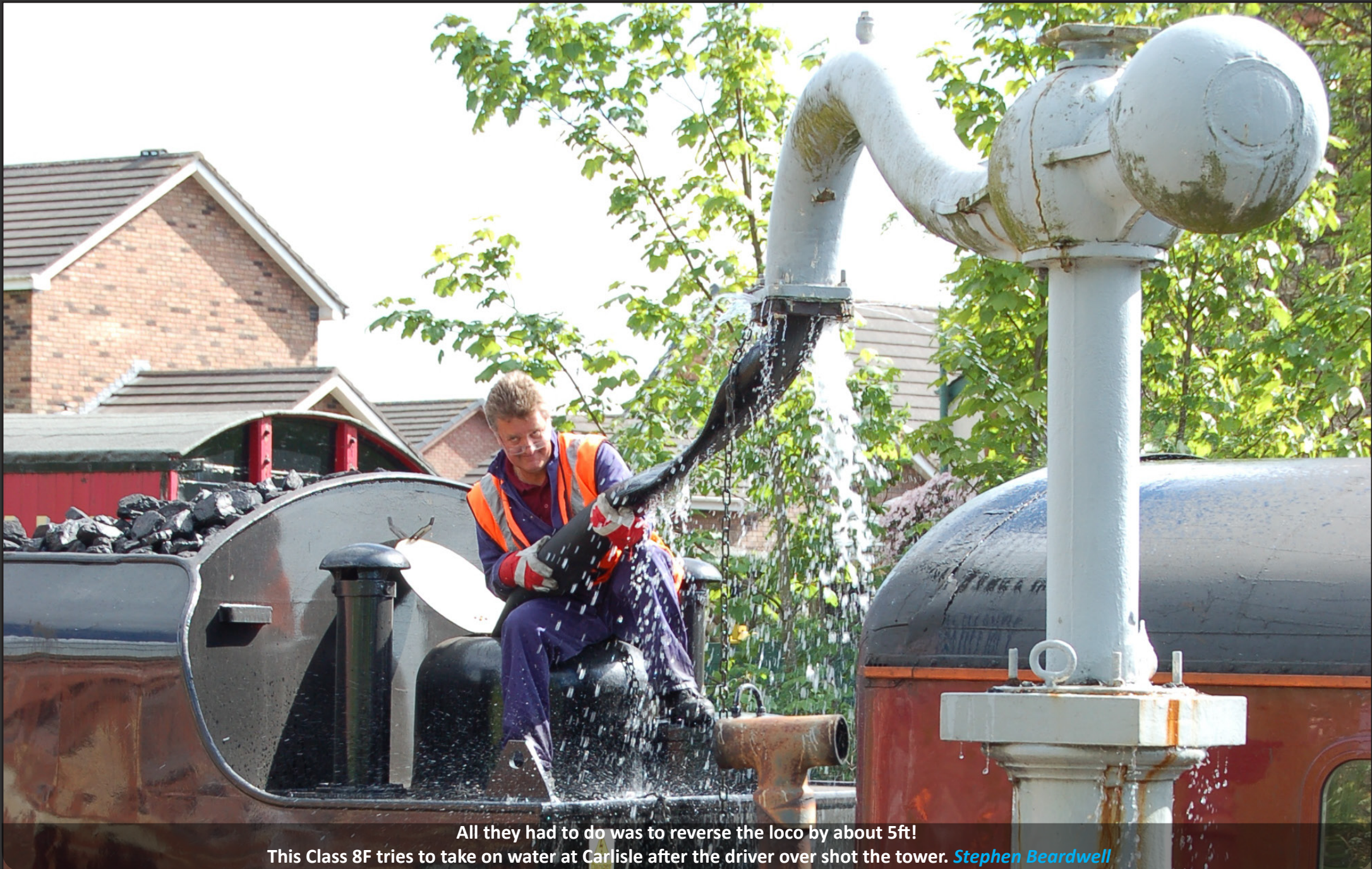
All they had to do was to reverse the loco by about 5ft! This Class 8F tries to take on water at Carlisle after the driver over shot the tower.