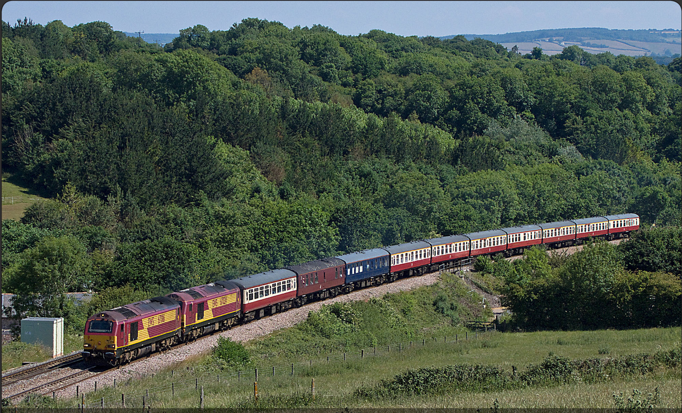
Another Mazey day charter on June 26th was Class 67 016 and 67 024 with 1284 Paddington - Penzance seen here at Daignton Bank on June 26th.