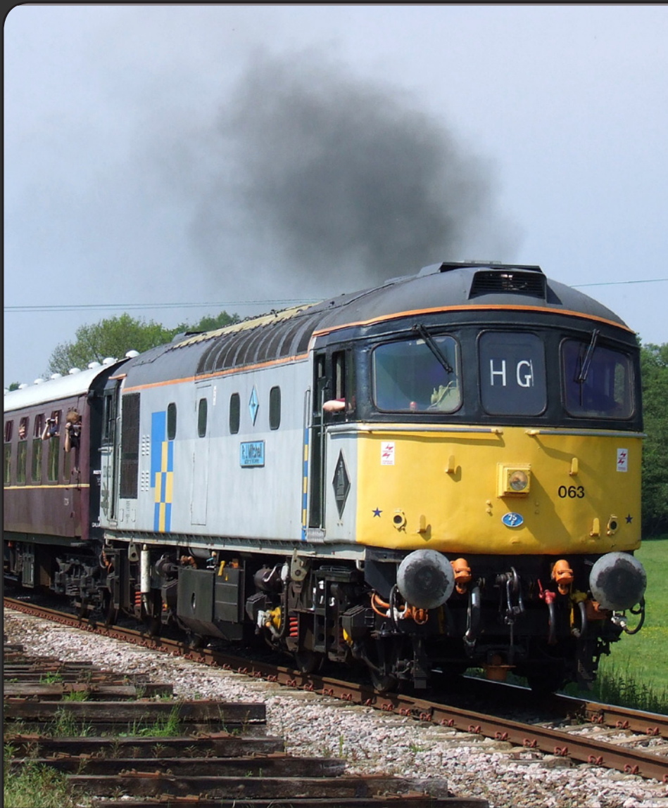
Class 33 063 “R. J. Mitchell” accelerates towards Pokehill Crossing, between Groombridge and High Rocks, Kent, working the 10:37 Groombridge Junction - Tunbridge Wells West service during the Spa Valley Railway’s diesel dunning day on June 5th.