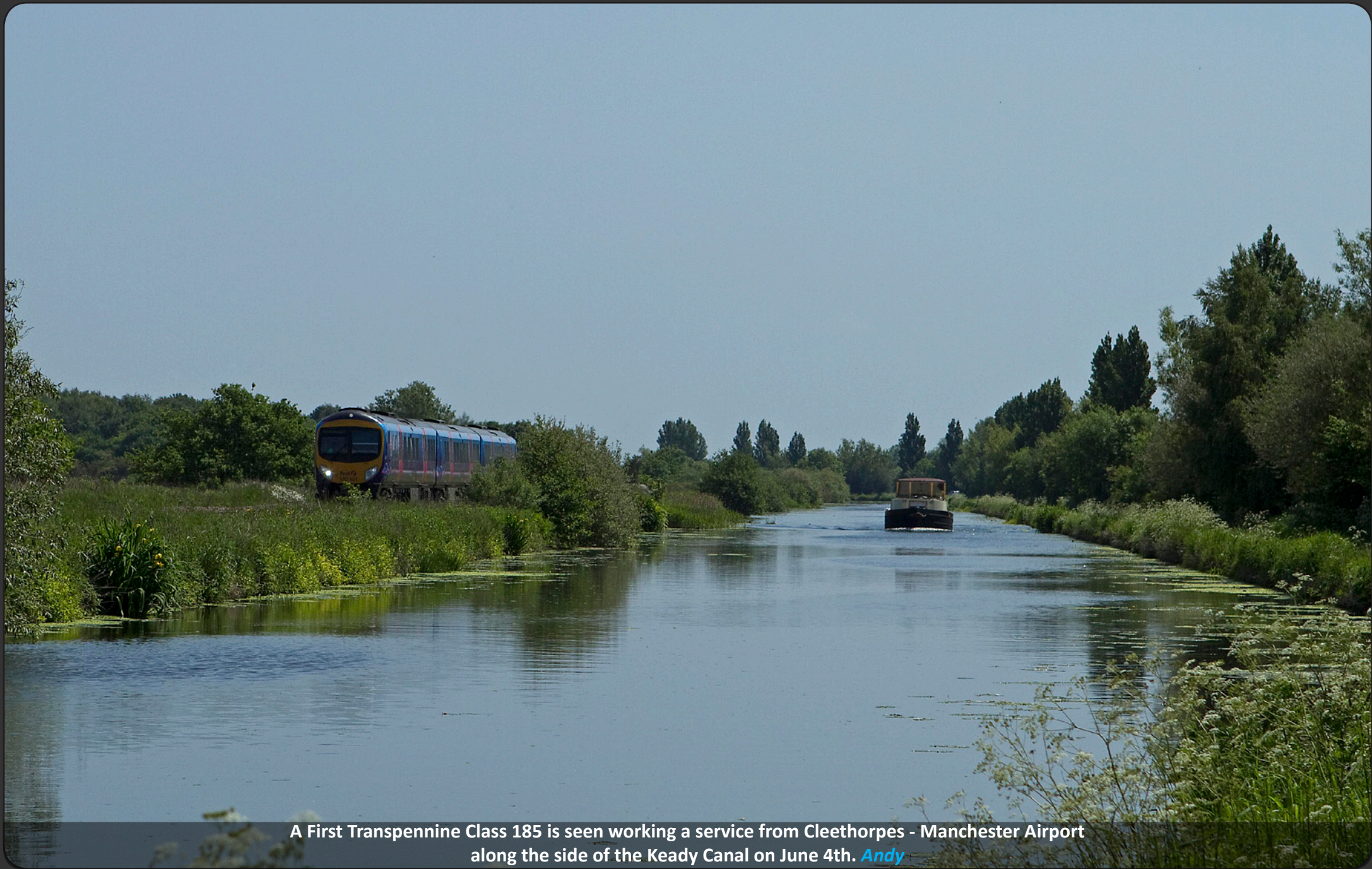
A First Transpennine Class 185 is seen working a service from Cleethorpes - Manchester Airport along the side of the Keady Canal on June 4th.