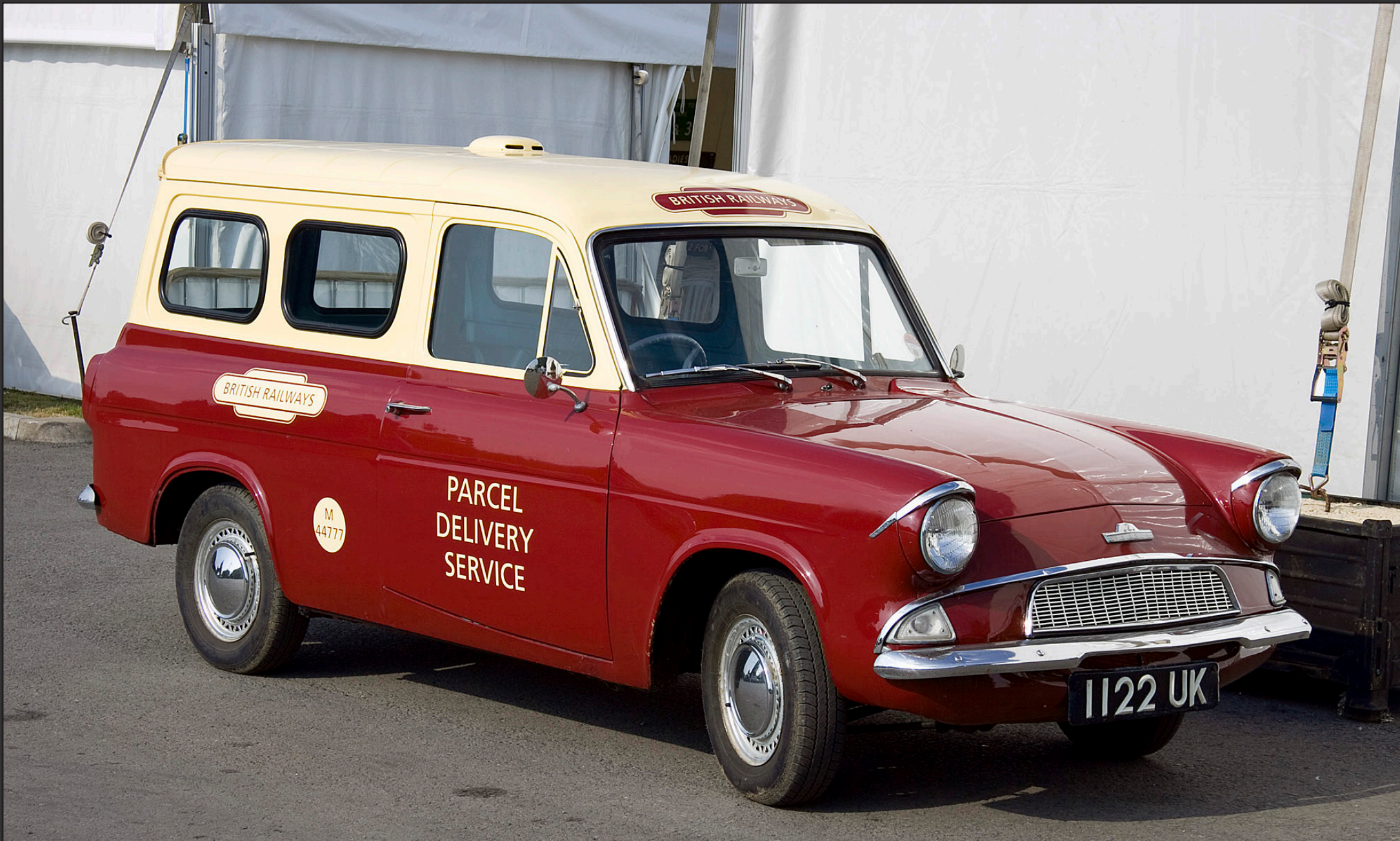
This rather smart BR parcels delivery van was spotted recently in the yard at Toddington on the Gloucester and Warwickshire Railway.