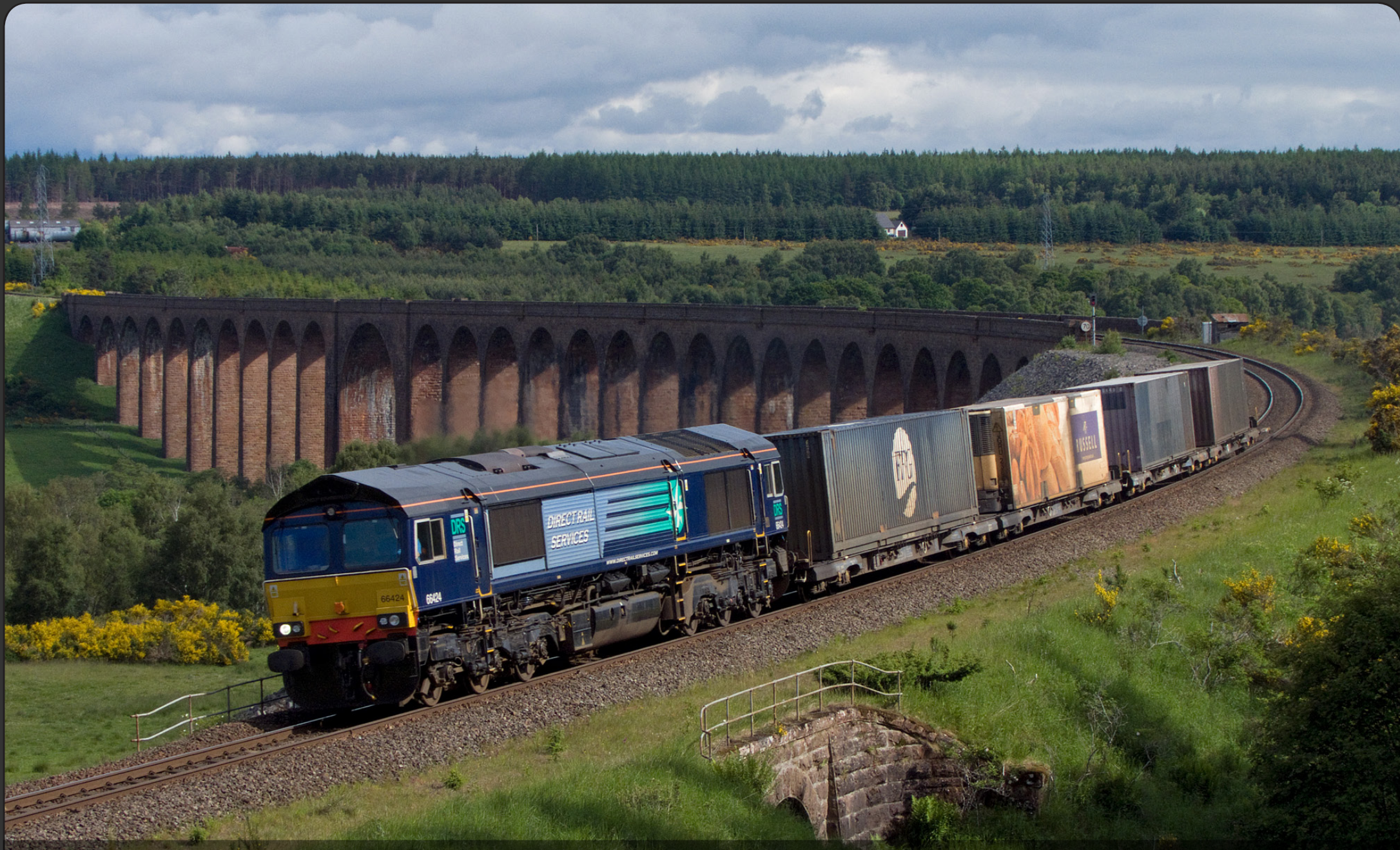
DRS Class 66 424 is seen crossing Culloden Viaduct on June 21st with the 4Z50 Inverness - Grangemouth. Carl Grocott