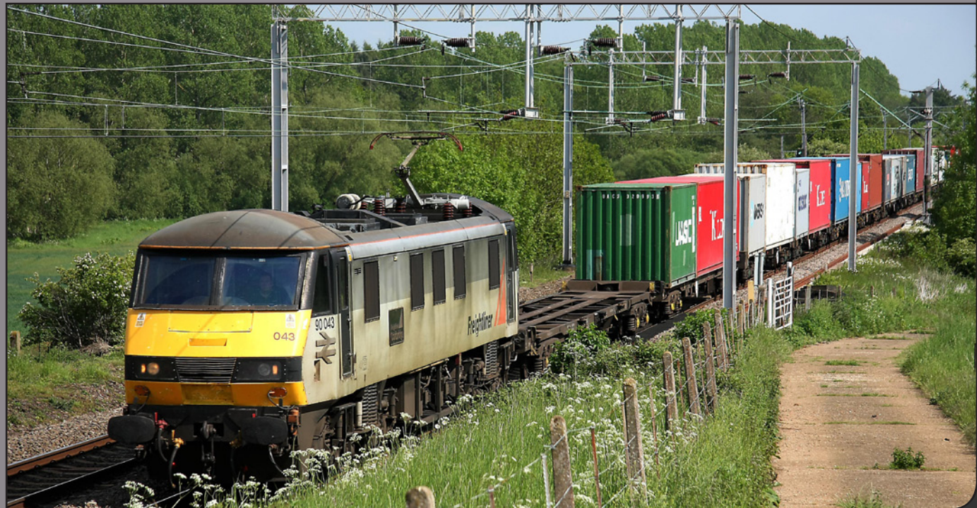
Bottom Right: Freightliner's Class 90 043 leads 4M88 Felixtowe to Coatbridge liner through Chapel Brampton, on June 2nd. Derek Elston