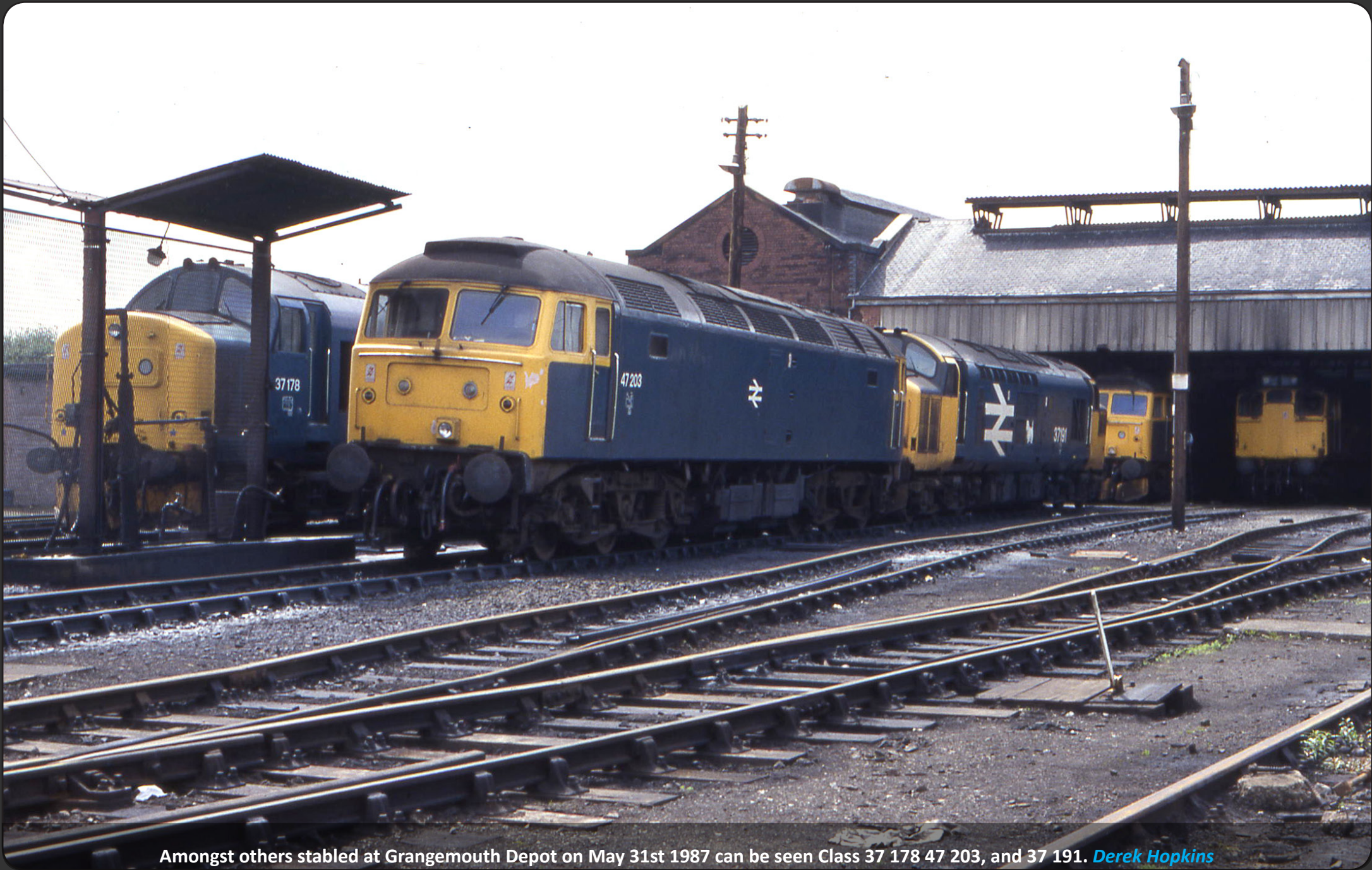
Amongst others stabled at Grangemouth Depot on May 31st 1987 can be seen Class 37 178 47 203, and 37 191.