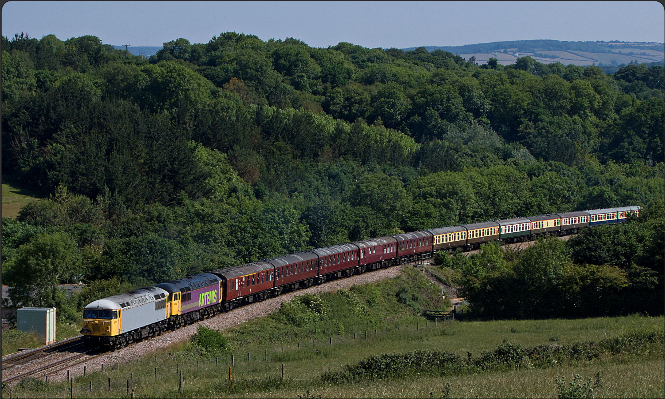
Grid action as Class 56 311 leads 56 312 on 1Z80 Tame Bridge - Penzance Mazey day charter at Daignton Bank on June 26th. Carl Grocott