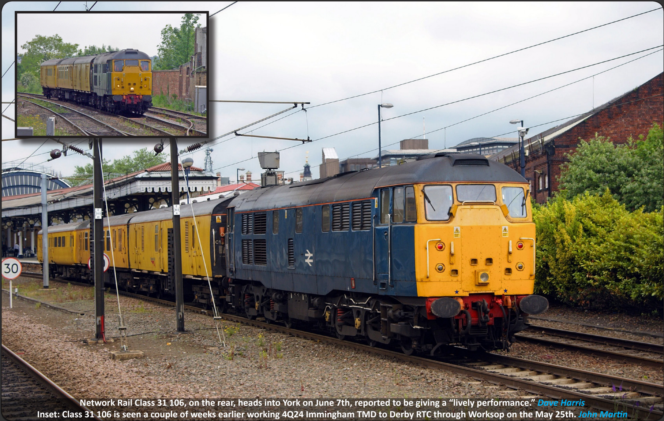
Network Rail Class 31 106, on the rear, heads into York on June 7th, reported to be giving a “lively performance.” Inset: Class 31 106 is seen a couple of weeks earlier working 4Q24 Immingham TMD to Derby RTC through Worksop on the May 25th.