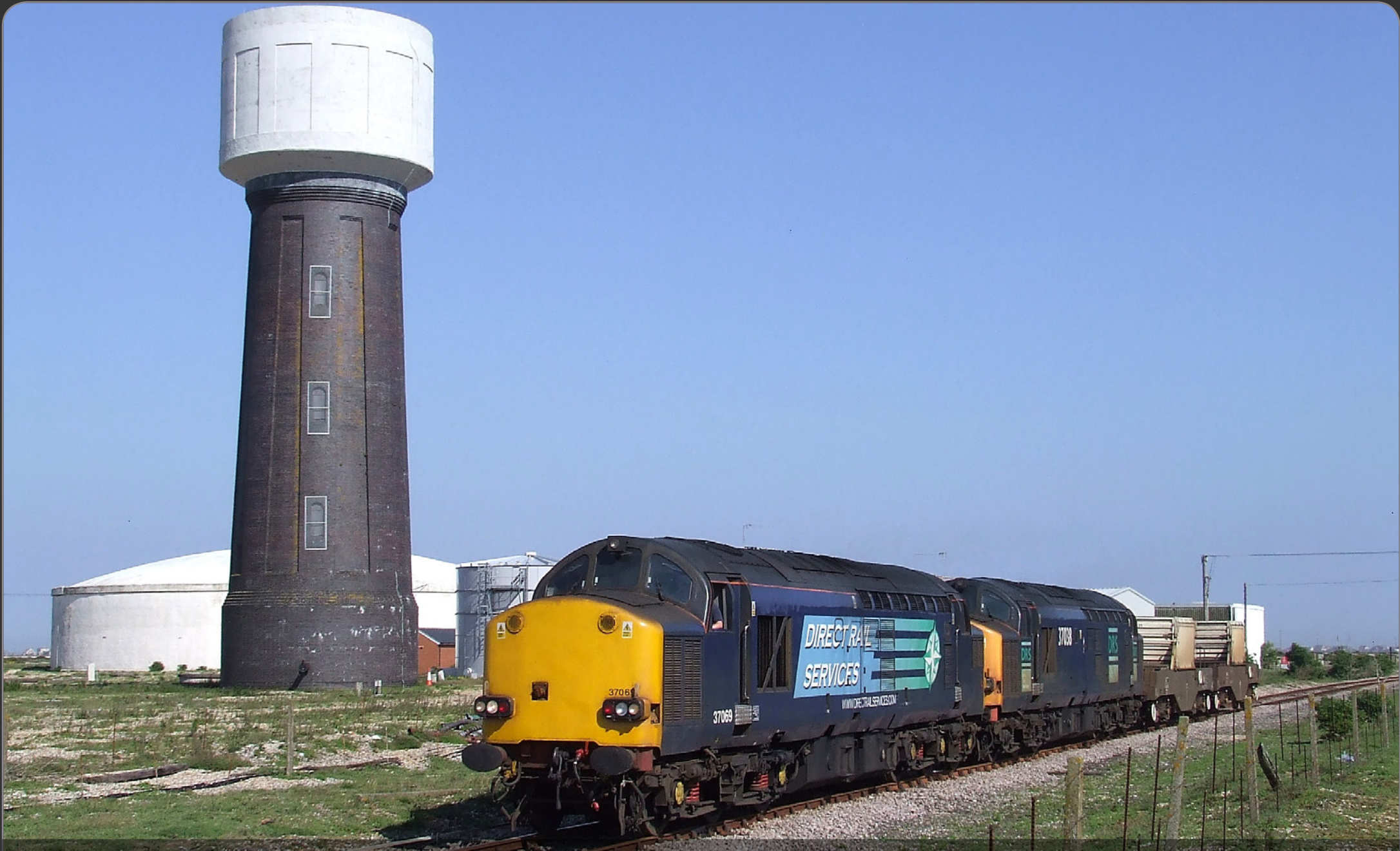
Class 37 069 and 37 038 pass a waterworks near Dungeness, Kent, whilst working 6M95 Dungeness - Willesden Brent flasks on June 4th.