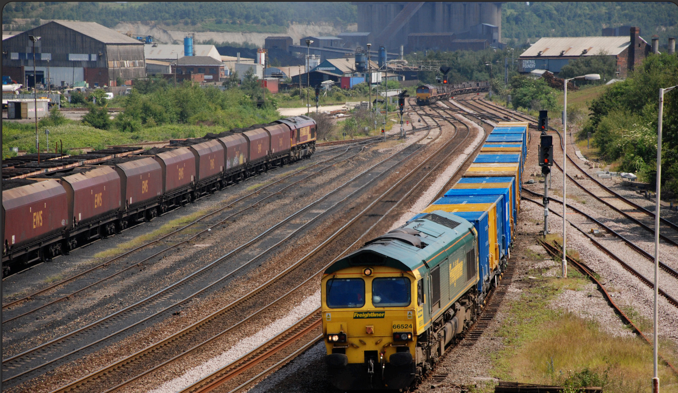
Three for the price of one today with Class 66 524 heading away from Frodingham Trent Jct. on 6M07 Roxby-Dean Lane bin train, while, in the background, 66 151 negotiates the crossovers towards the North Lindsey Light Railway on 6D56 Entrance C - Normanby Park. In the Goods Yard, 66 237, having run-round it's train, is waiting a path with 6C75 from Immingham Bulk Terminal to the Coal Handling Plant. Steve Thompson