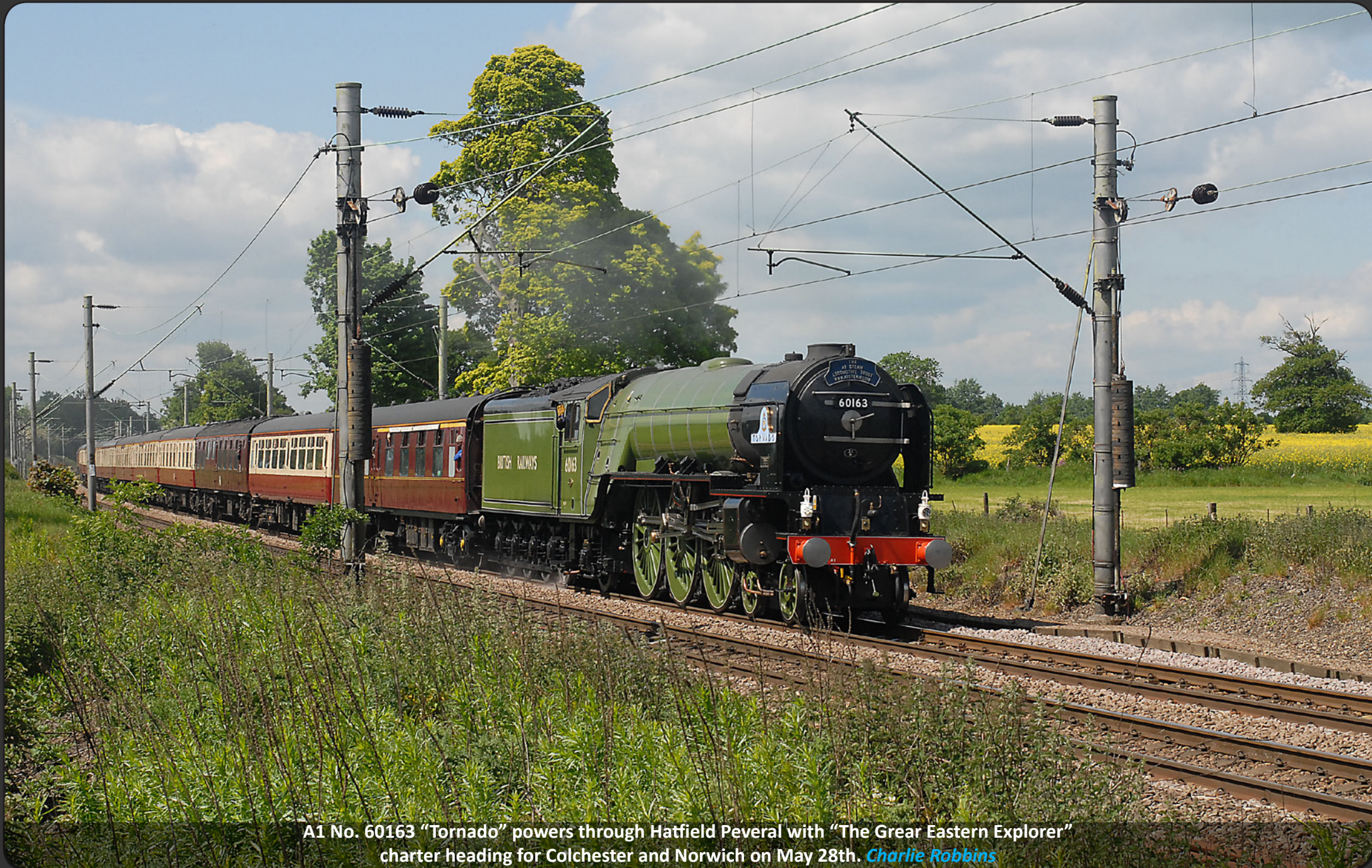
A1 No. 60163 "Tornado" powers through Hatfield Peveral with "The Great Eastern Explorer" charter heading for Colchester and Norwich on May 28th.