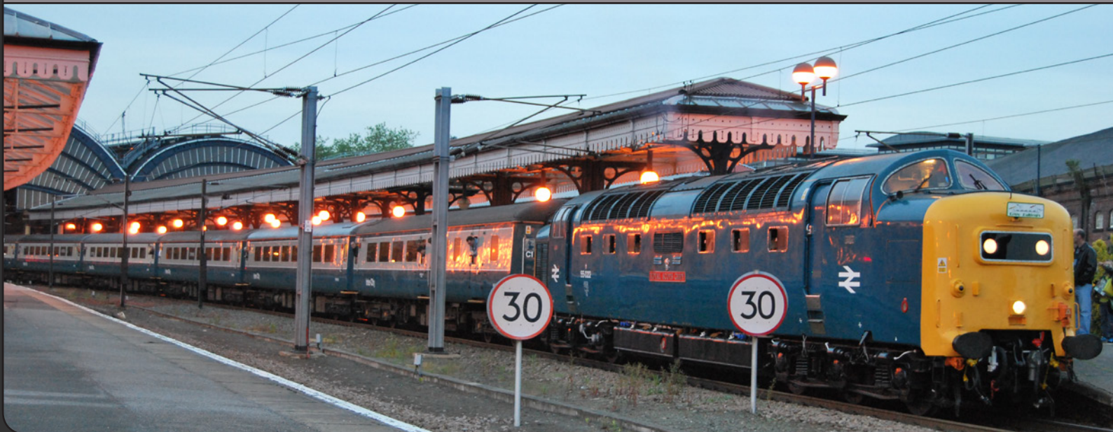
Bottom Left: With the return "Deltic Retro Scot II" 1Z88 Edinburgh - Sheffield charter Class 55 022 is seen pausing at York after storming down the East Coast Main Line on May 31st.