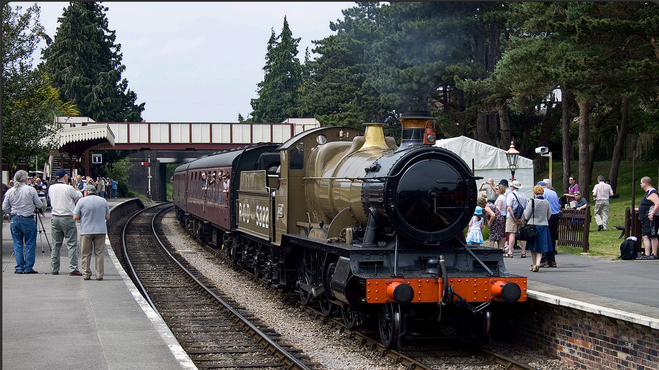
The Gloucester and Warwickshire's Cotswold Festival of Steam/GWR 175 gala at the beginning of June was an excellent day out with plenty to see and travel behind. This is Great Western Railway No. 5322 which was built in October 1917 and sent when new to France, along with other members of the class, to haul supply trains between Calais and railheads for the front line, painted in authentic Railway Operating Division khaki livery the loco makes an impressive sight at Winchcombe on June 5th.