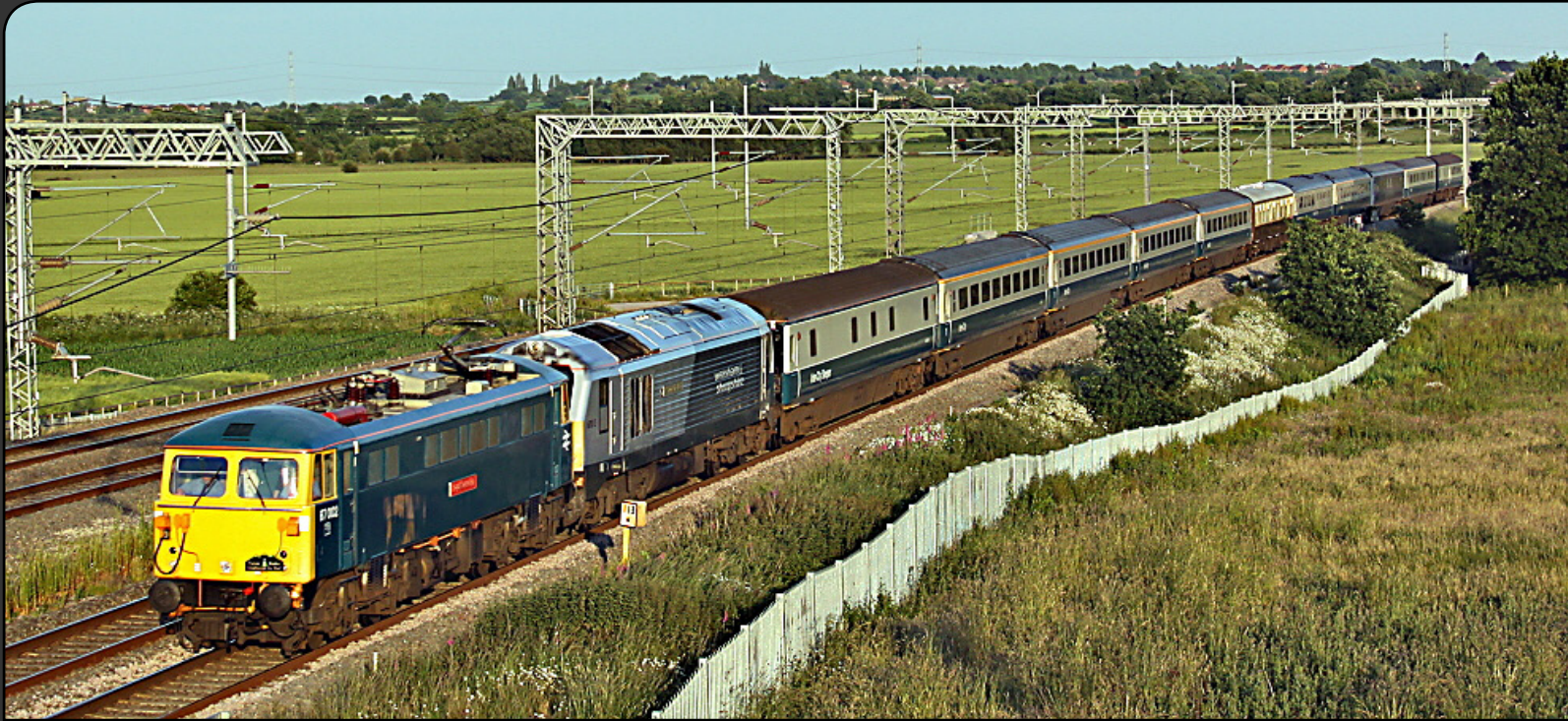
Top Left: In connection with the Three Peaks Challenge, Class 87 002 leads 67 029 working 1T56 Euston - Bangor through Hademore on June 24th.