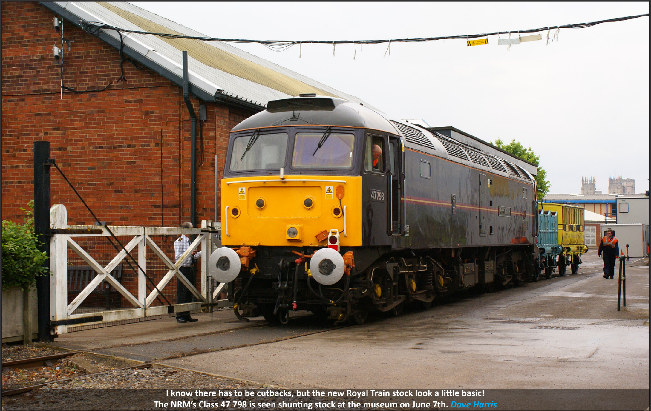
I know there has to be cutbacks, but the new Royal Train stock look a little basic! The NRM's Class 47 798 is seen shunting stock at the museum on June 7th.