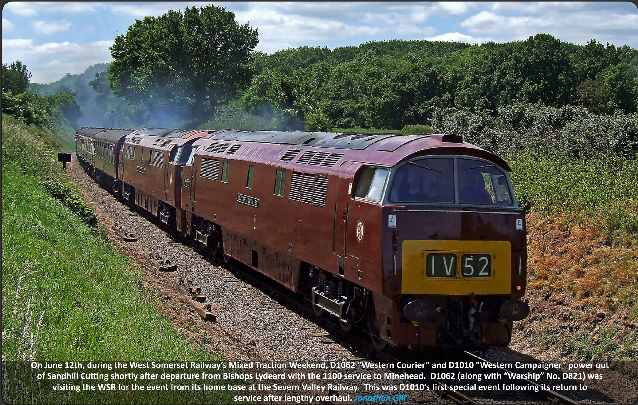
On June 12th, during the West Somerset Railway's Mixed Traction Weekend, D1062 "Western Courier" and D1010 "Western Campaigner" power out of Sandhill Cutting shortly after departure from Bishops Lydeard with the 1100 service to Minehead. D1062 (along with "Warship" No. D821) was visiting the WSR for the event from its home base at the Severn Valley Railway. This was D1010's first special event following its return to service after lengthy overhaul.