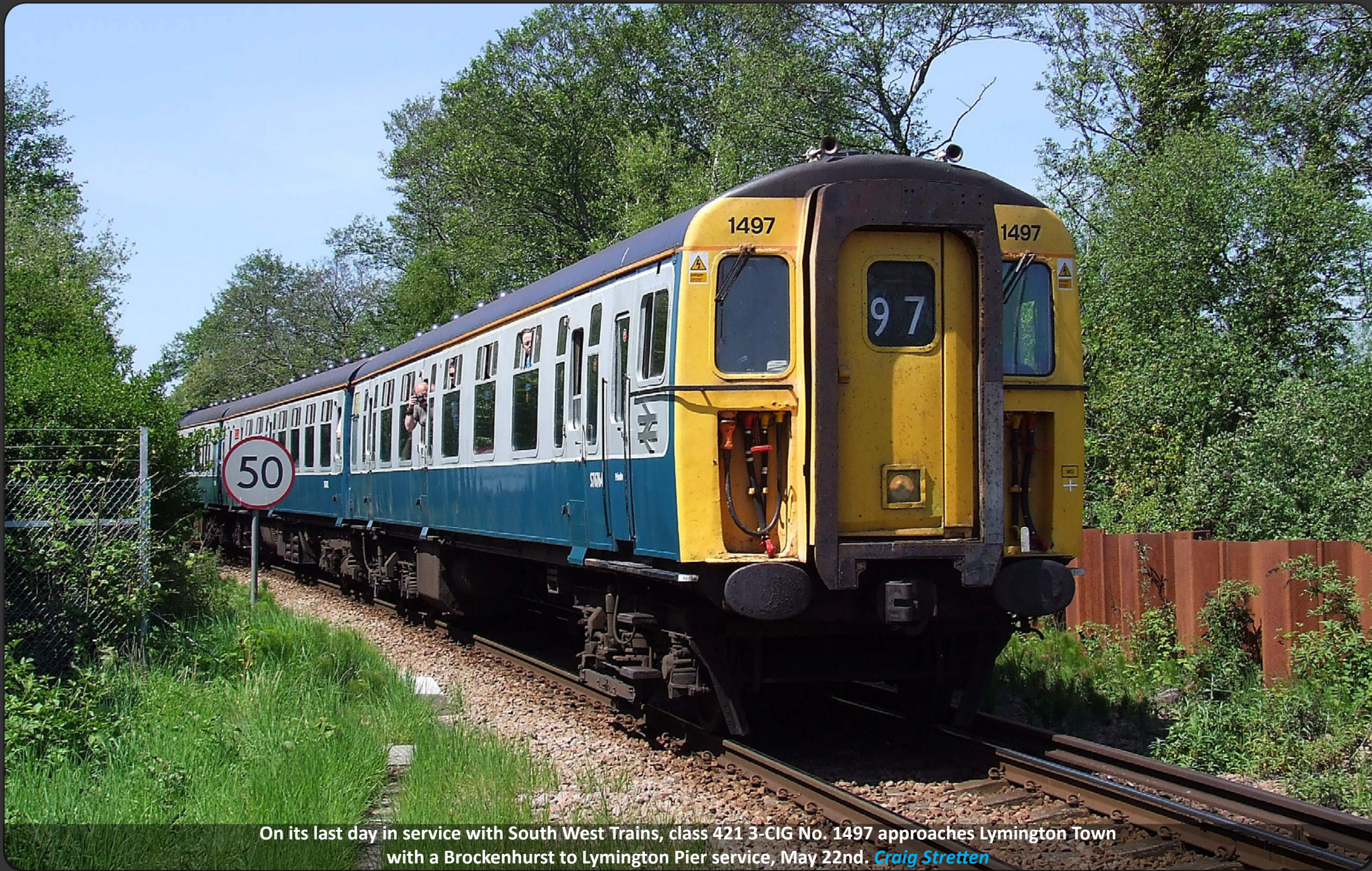
On its last day in service with South West Trains, class 421 3-CIG No. 1497 approaches Lymington Town with a Brockenhurst to Lymington Pier service, May 22nd. Craig Stretten