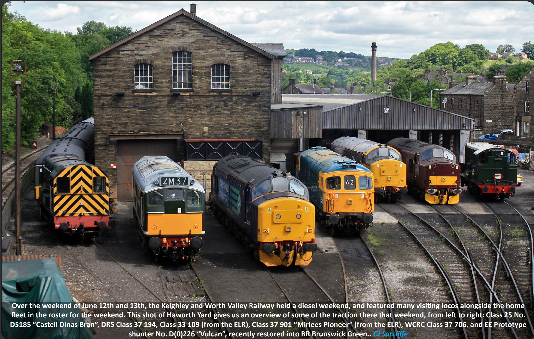
Over the weekend of June 12th and 13th, the Keighley and Worth Valley Railway held a diesel weekend, and featured many visiting locos alongside the home fleet in the roster for the weekend. This shot of Haworth Yard gives us an overview of some of the traction there that weekend, from left to right: Class 25 No. D5185 "Castell Dinas Bran", DRS Class 37 194, Class 33 109 (from the ELR), Class 37 901 "Mirlees Pioneer" (from the ELR), WCRC Class 37 706, and EE Prototype shunter No. D(0)226 "Vulcan", recently restored into BR Brunswick Green..