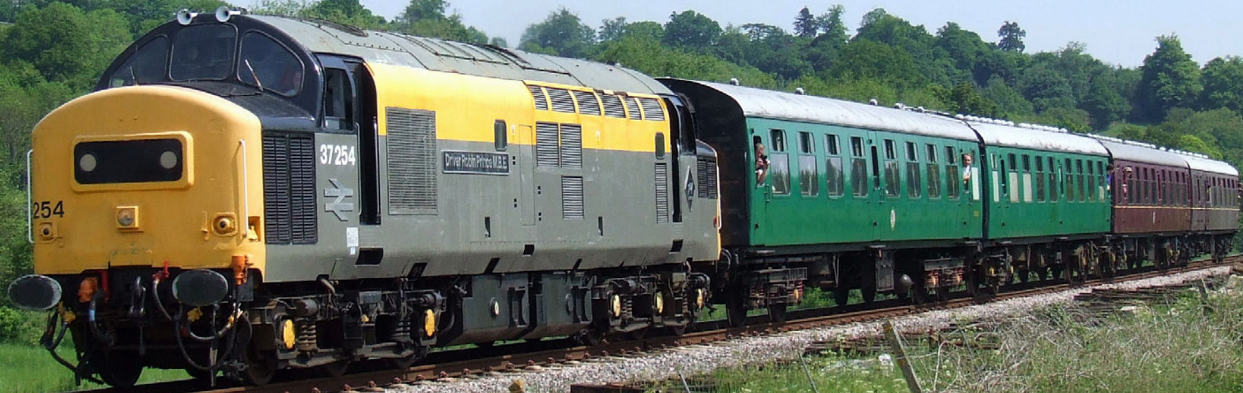
Class 37 254 "Driver Robin Prince M.B.E." approaches Pokehill Crossing, between High Rocks and Groombridge, Kent, with the 11:10 Tunbridge Wells West - Groombridge Junction service during the Spa Valley Railway's Diesel running day on June 5th. Craig Stretten