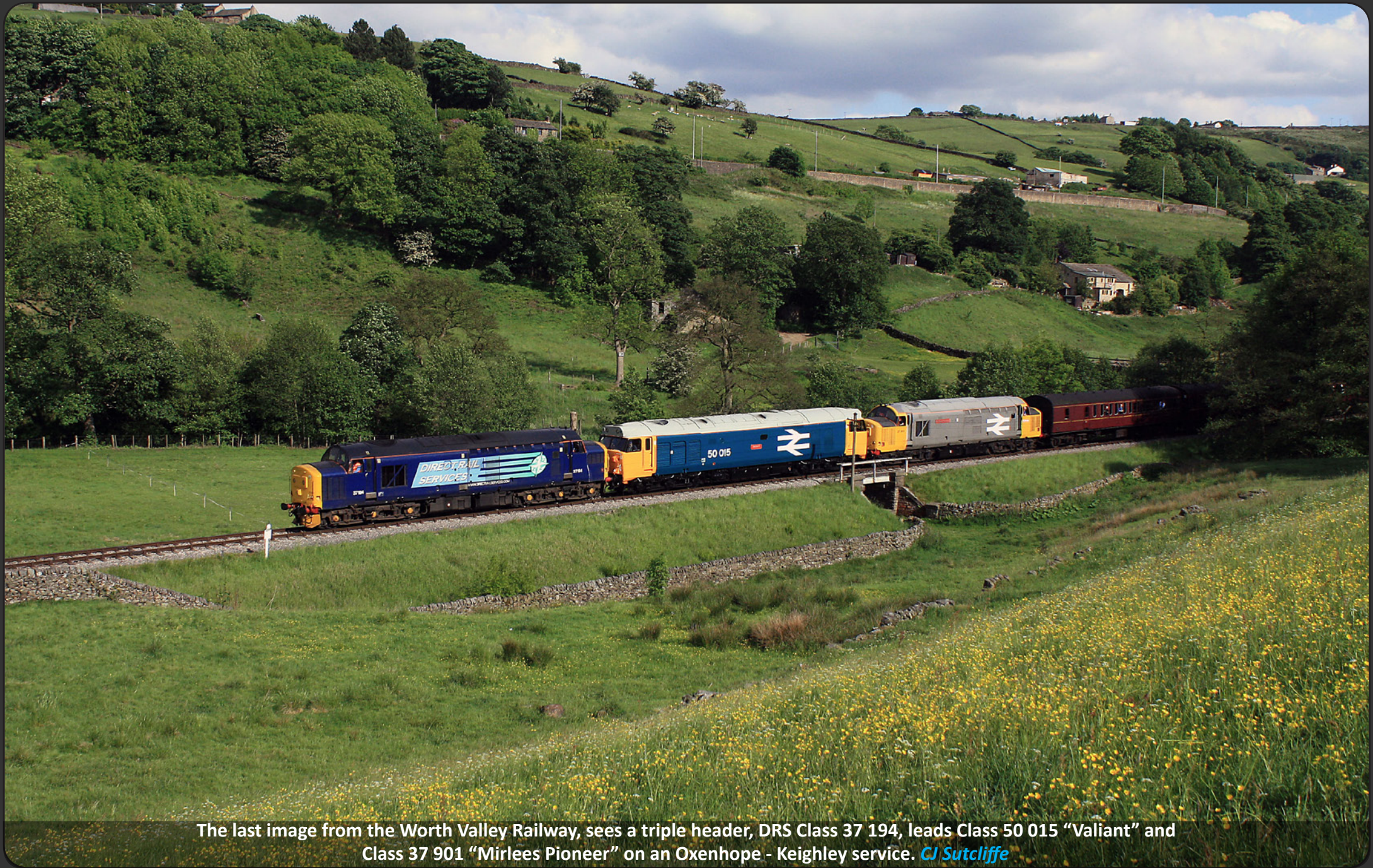
The last image from the Worth Valley Railway, sees a triple header, DRS Class 37 194, leads Class 50 015 "Valiant" and Class 37 901 "Mirlees Pioneer" on an Oxenhope - Keighley service. CJ Sutcliffe