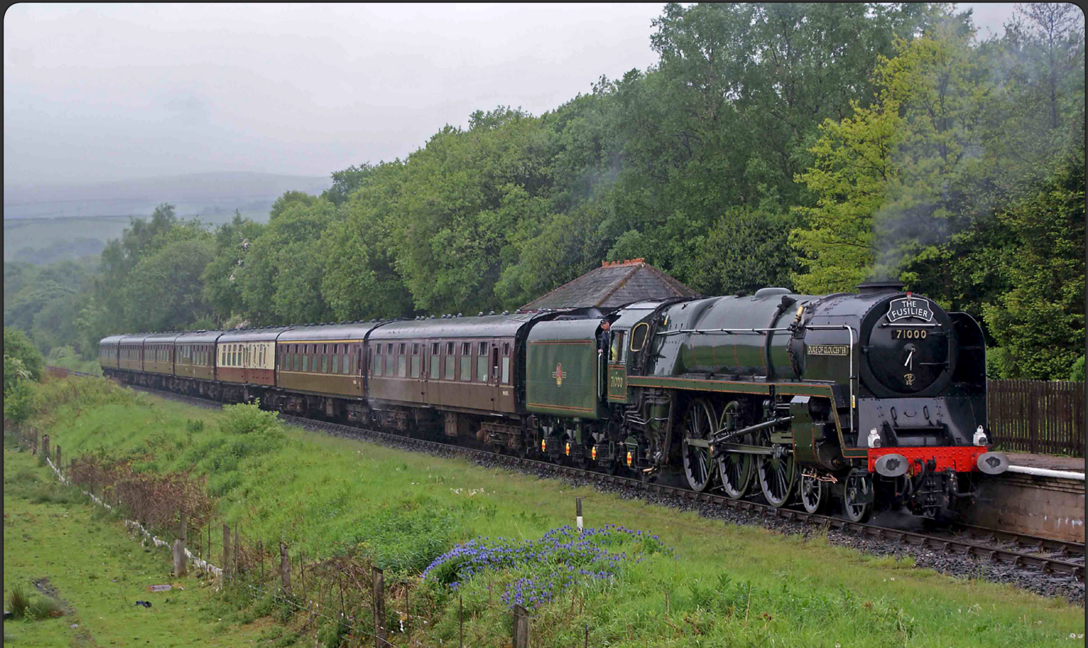
On a very wet Saturday at the ELR's 1940s event, BR Class 8P No. 71000 "Duke of Gloucester" is seen in Irwell Vale Station heading towards Rawtenstall.