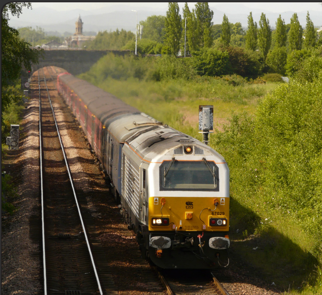
Above: On June 18th, Compass tours ran a charter from Nuneaton - Dundee featuring Class 67 018 and 67 029. This is Class 67 029 leading the tour through Perth on the 1234 return working.