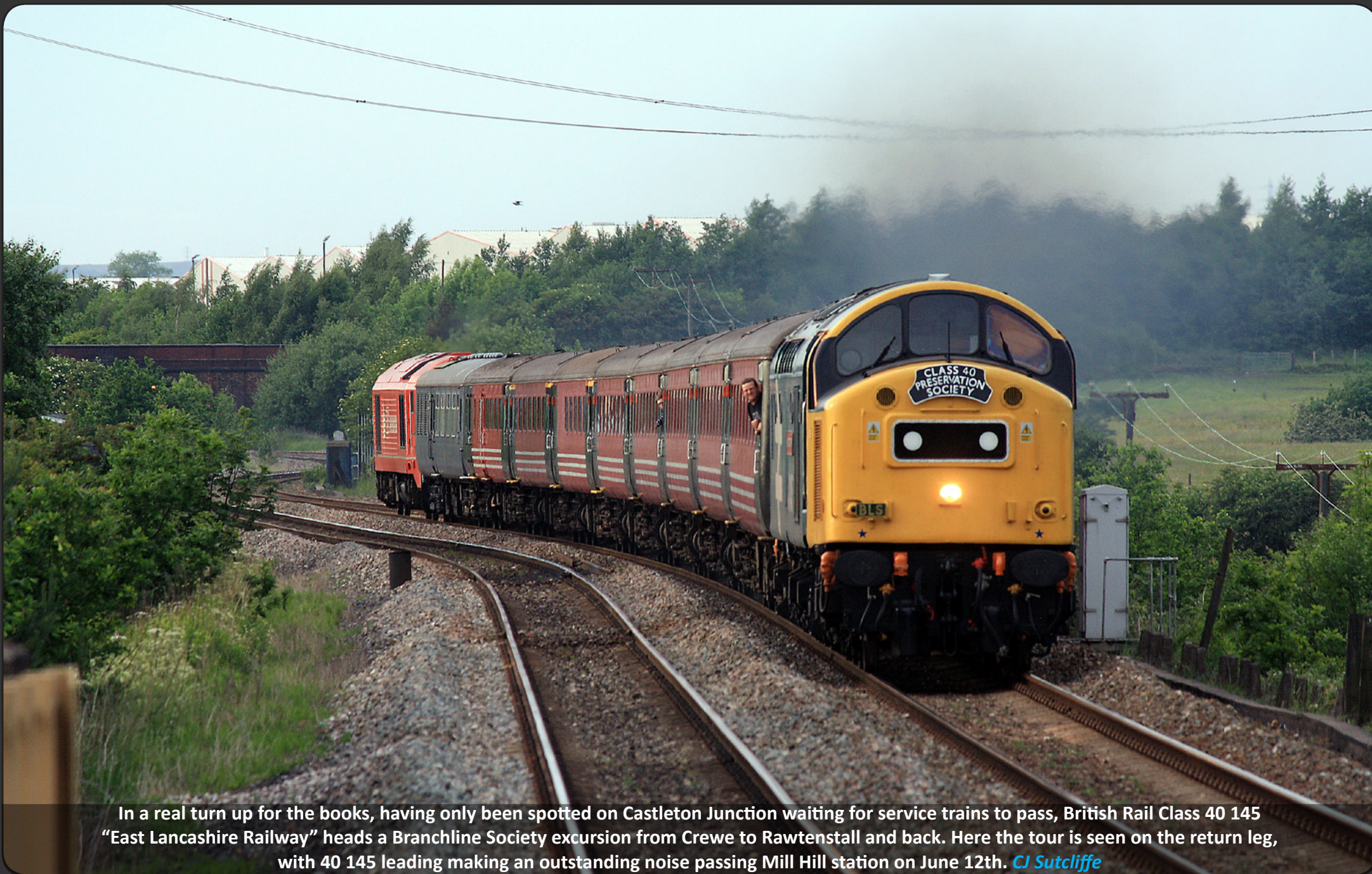
In a real turn up for the books, having only been spotted on Castleton Junction waiting for service trains to pass, British Rail Class 40 145 "East Lancashire Railway" heads a Branchline Society excursion from Crewe to Rawtenstall and back. Here the tour is seen on the return leg, with 40 145 leading making an outstanding noise passing Mill Hill station on June 12th. CJ Sutcliffe