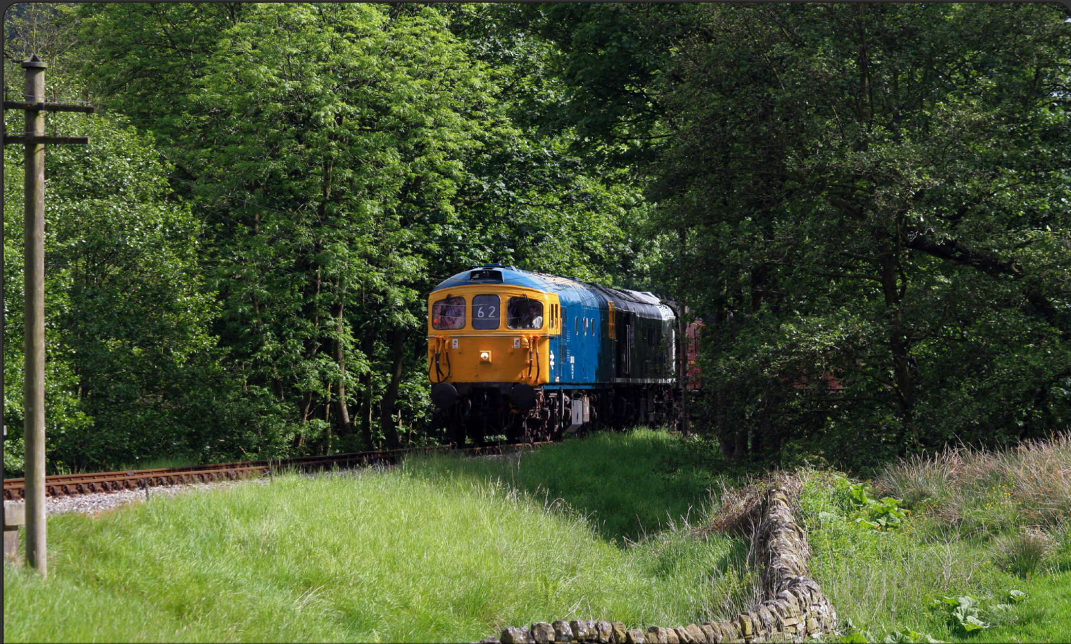
Class 33 109 leads Class 25 No. D5185 heading southbound on an Oxenhope - Keighley service. CJ Sutcliffe