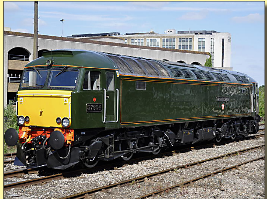
Photo: First Great Western Class 57 604 now sports GWR Green Livery complete with GWR crest and cast numbers as seen at Reading on June 20th.

Great Western Society chairman, Richard Croucher, said: "We still have more work to do on our Pendennis Castle but we hope that, when she is complete, the two locomotives can perform together out on the main line as a living demonstration of both the fascinating history of the Great Western Railway and the vital contribution that it still makes to our modern society."