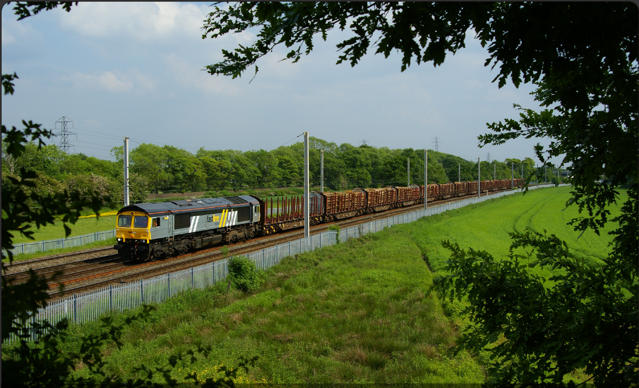
Still carrying the defunct Fastline livery, Class 66 434 is seen heading north through Winwick Jct. on June 4th with a loaded 6C19 Chirk - Carlisle.