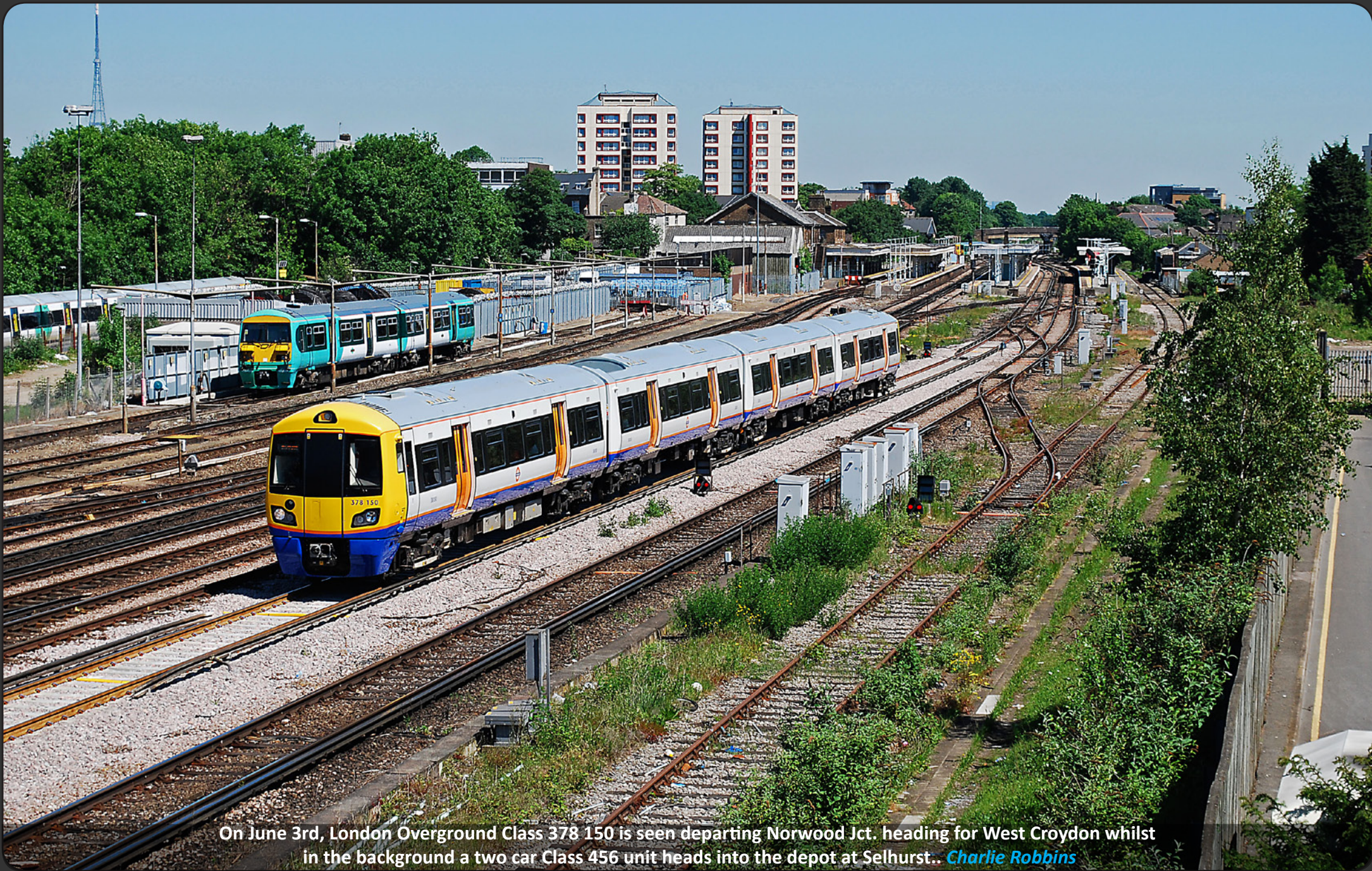
On June 3rd, London Overground Class 378 150 is seen departing Norwood Jct. heading for West Croydon whilst in the background a two car Class 456 unit heads into the depot at Selhurst.. Charlie Robbins