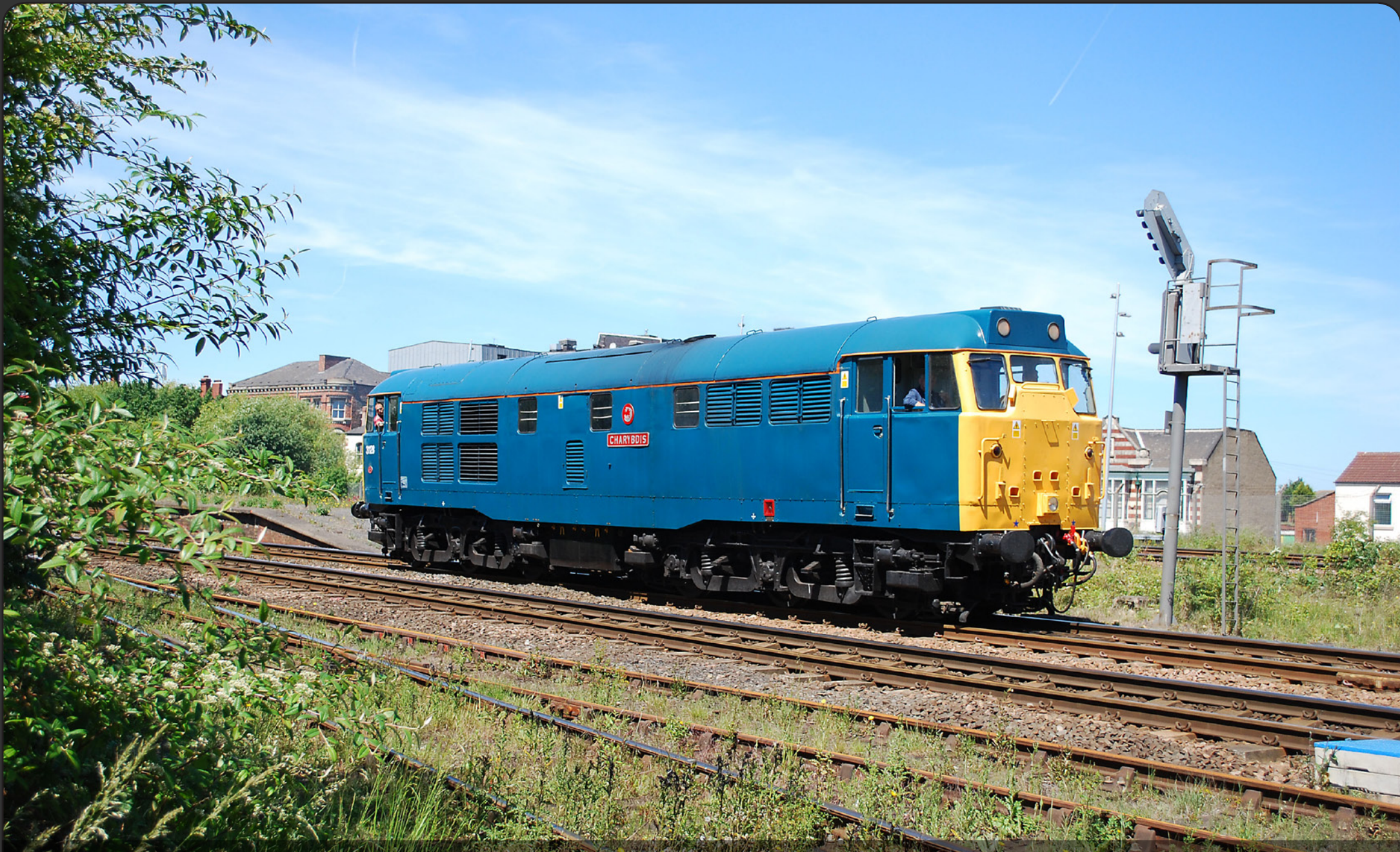
On June 22nd, Class 31 128 is seen at Middlesbrough working 0Z31 to Grosmont, NYMR. The loco is going on hire to assist during a steam ban.