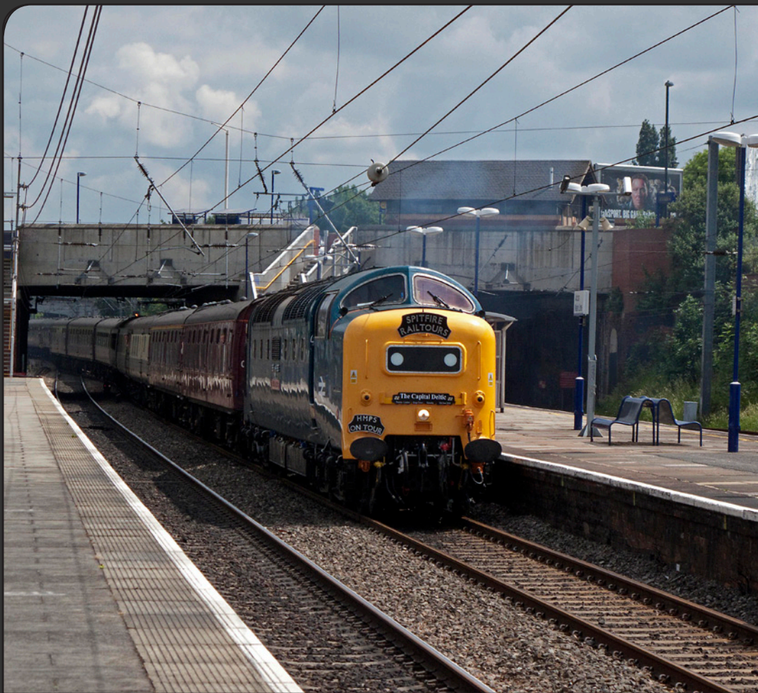
Right: Bang on time at 05:57 on June 12th, Deltic Class 55 022 "Royal Scots Grey" ascends Miles Platting bank upon departure from Manchester Victoria, operating Spitfire Railtours' "The Capital Deltic" from Preston to London Kings Cross and back.