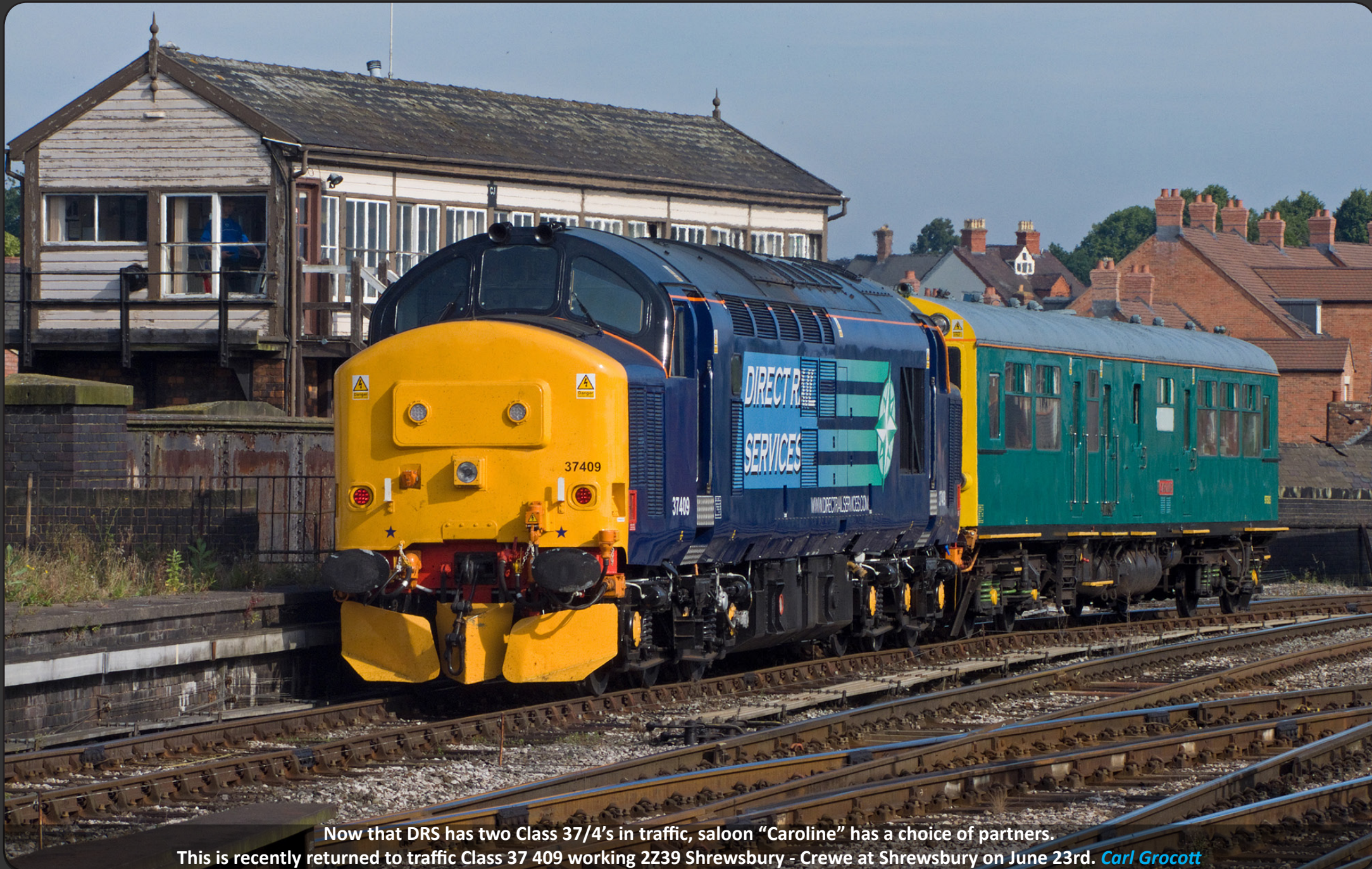
Now that DRS has two Class 37/4's in traffic, saloon "Caroline" has a choice of partners.