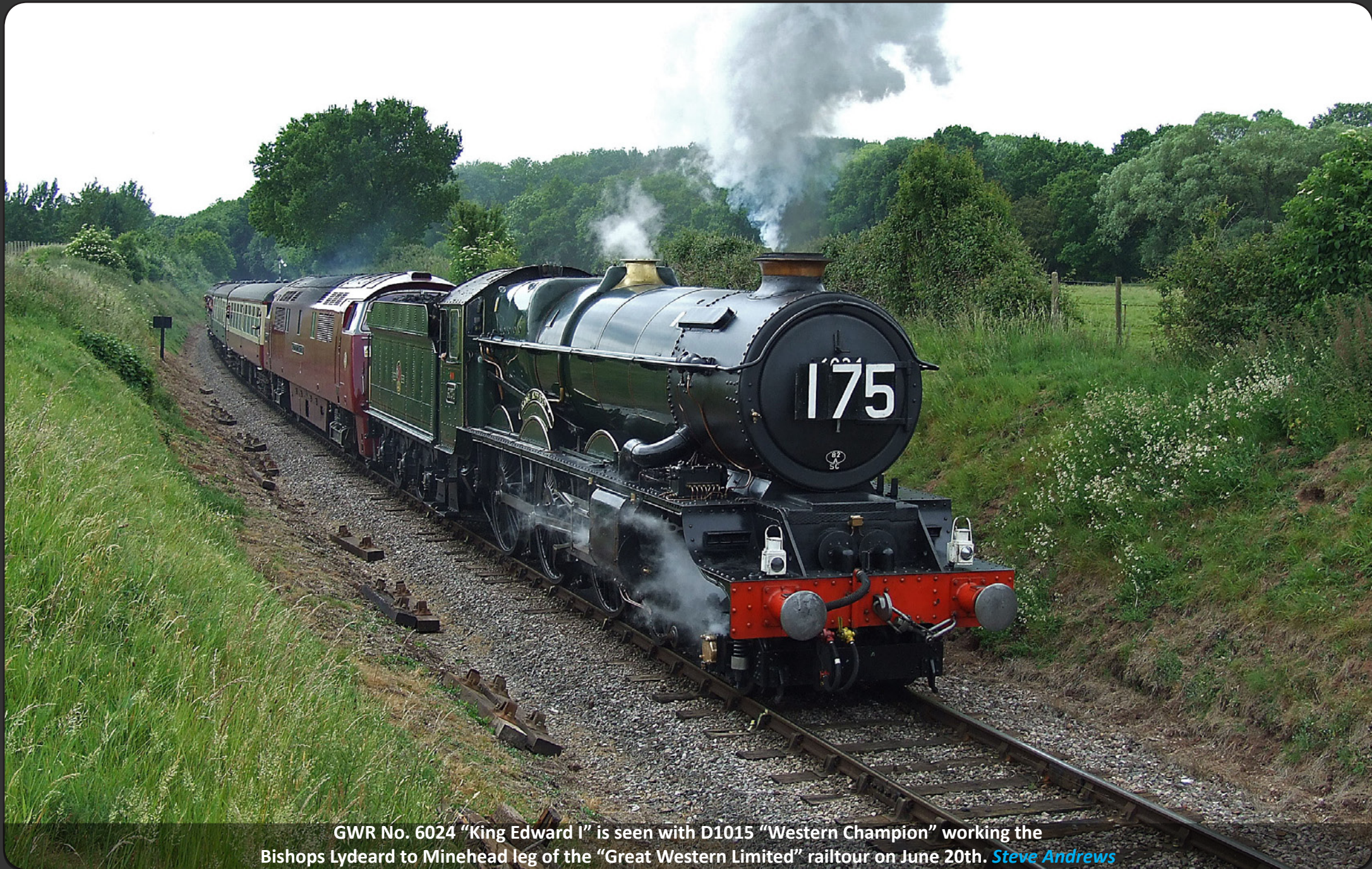
GWR No. 6024 "King Edward I" is seen with D1015 "Western Champion" working the Bishops Lydeard to Minehead leg of the "Great Western Limited" railtour on June 20th.