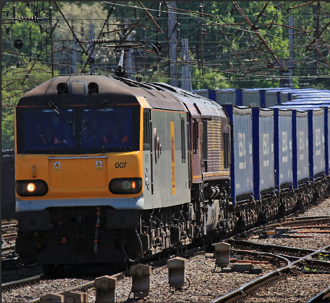
Above: On June 2nd, a very late “LessCo” Tesco intermodal service drew through Carlisle, with Class 92 007 at the head of the train conveying the normal Tesco rake plus 66 090 dead in tow heading for Mossend. CJ Sutcliffe