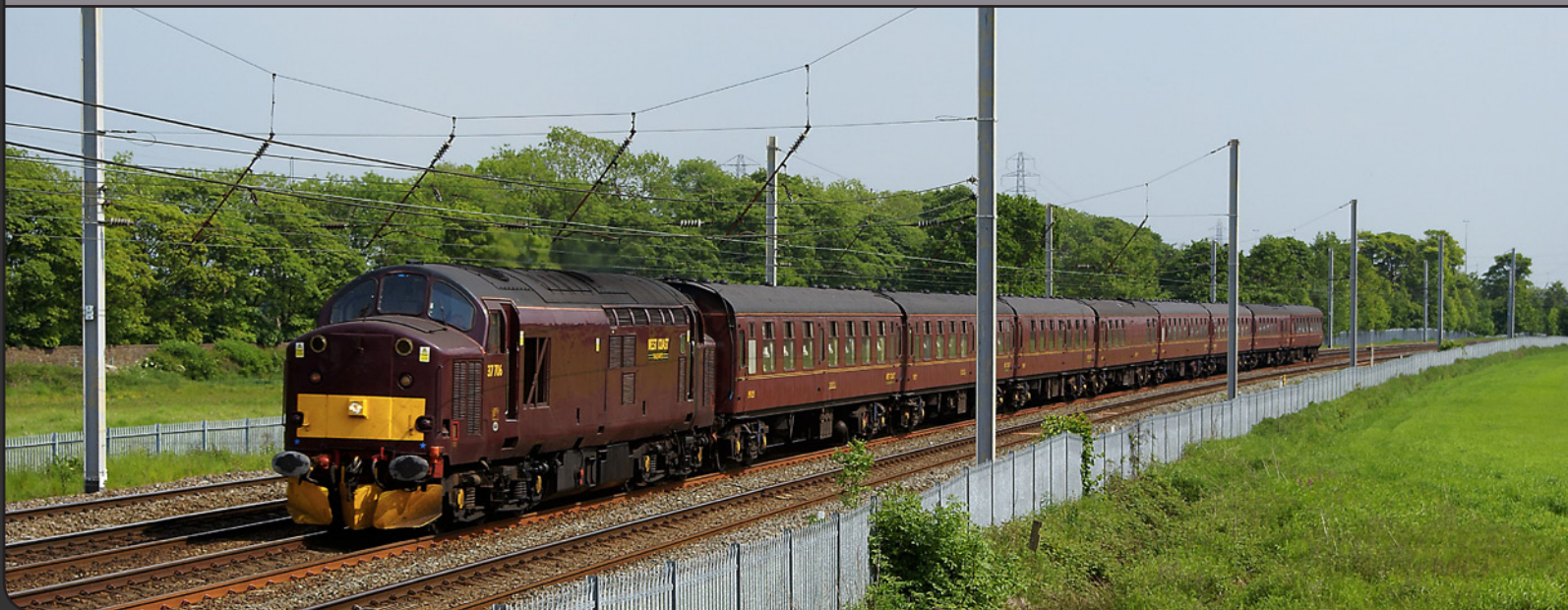
Bottom Left: West Coast's Class 37 706 heads north through Winwick Jct. in glorious sunshine with the 5Z37 Southall - Carnforth empties on June 4th.