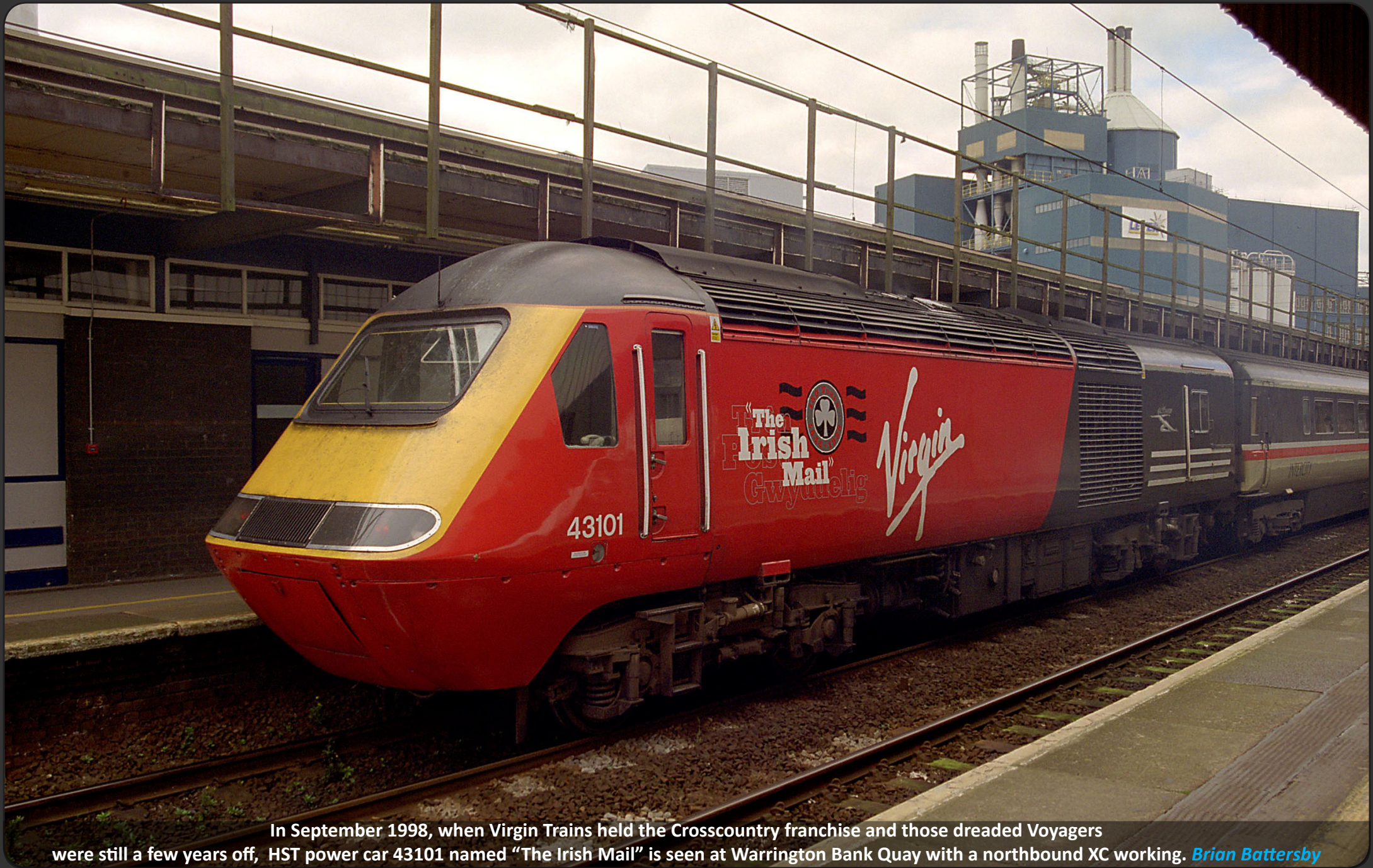
In September 1998, when Virgin Trains held the Crosscountry franchise and those dreaded Voyagers were still a few years off, HST power car 43101 named "The Irish Mail" is seen at Warrington Bank Quay with a northbound XC working.