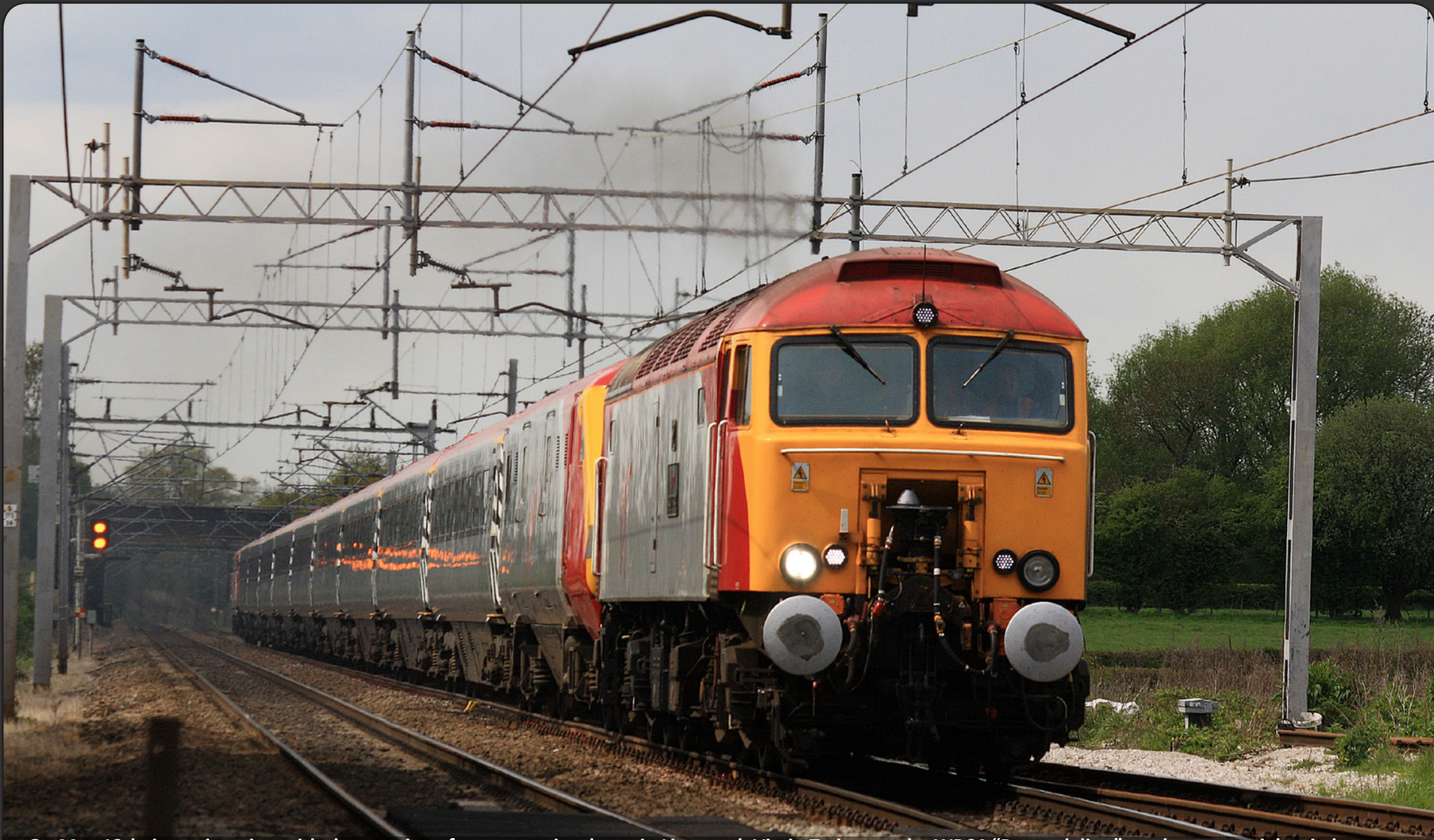
On May 12th, in conjunction with the opening of a new service depot in Liverpool, Virgin Trains ran the WB64 “Pretendalino” stock on a special train between Liverpool Lime Street and London Euston. The locomotives allocated to this run were Class 57 301 “Scott Tracy” and 57 312 “The Hood”. 57 312 is seen here approaching Acton Bridge station north of Crewe, on the first of 4 passes the train would make during the day.