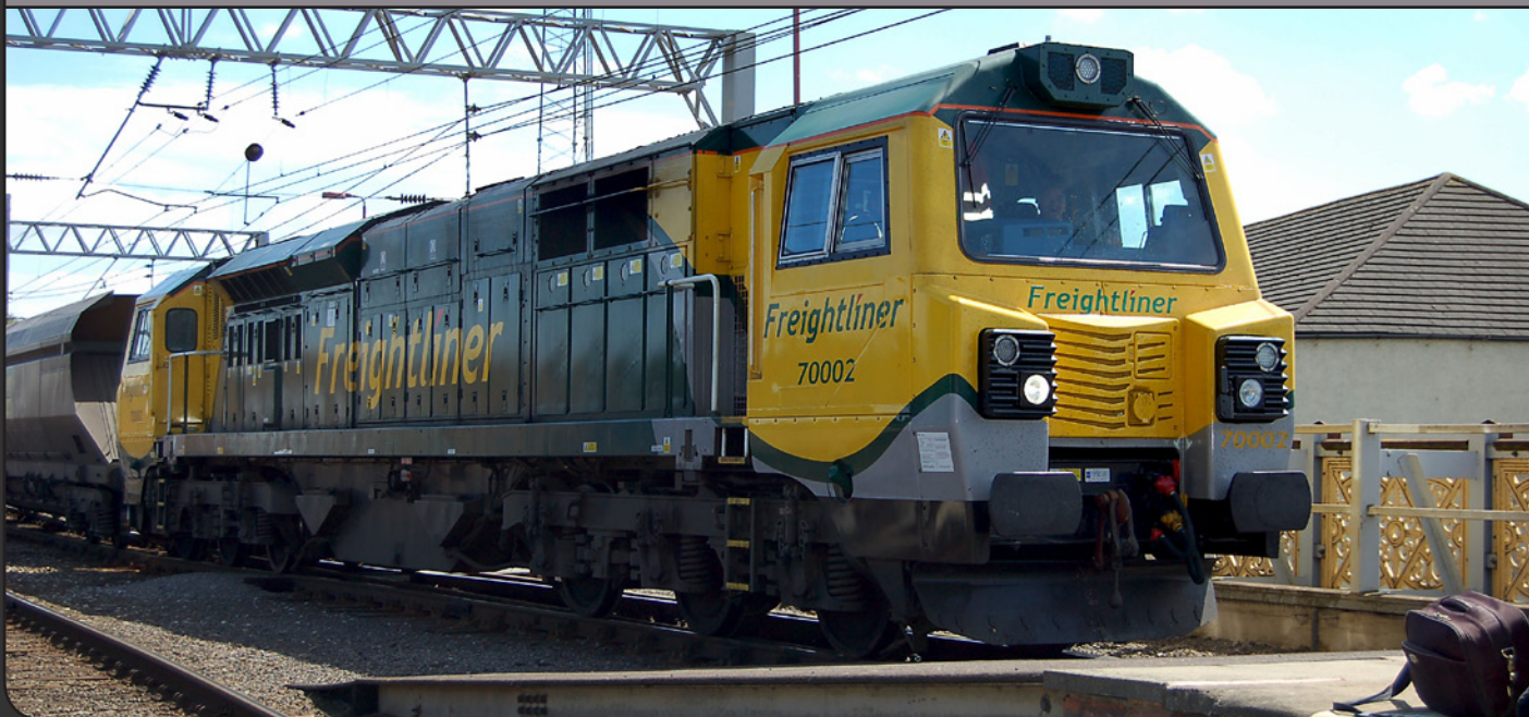
Left: Freightliner’s Class 70 002 is seen arriving into Carlisle on June 2nd.