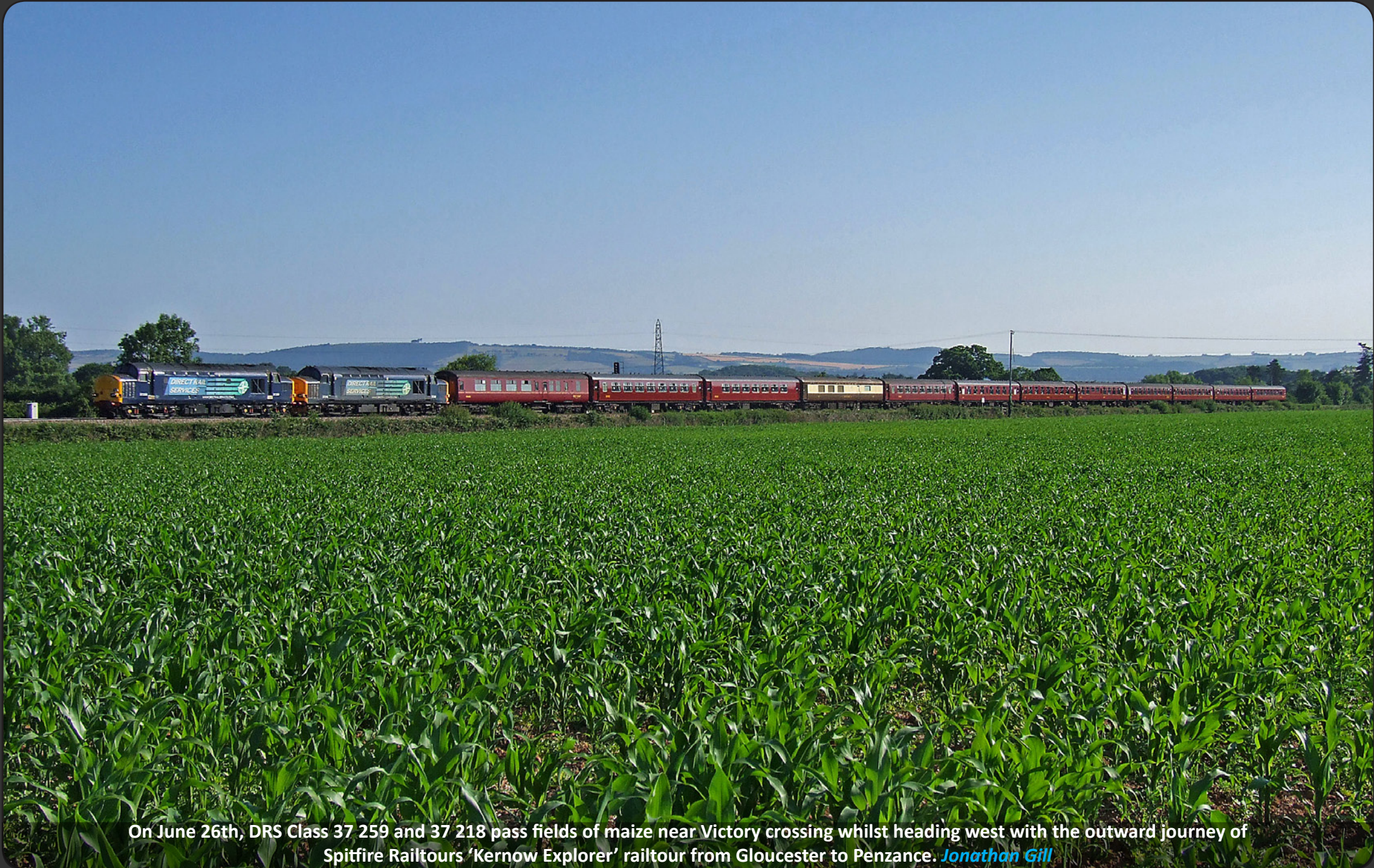
On June 26th, DRS Class 37 259 and 37 218 pass fields of maize near Victory crossing whilst heading west with the outward journey of Spitfire Railtours 'Kernow Explorer' railtour from Gloucester to Penzance.