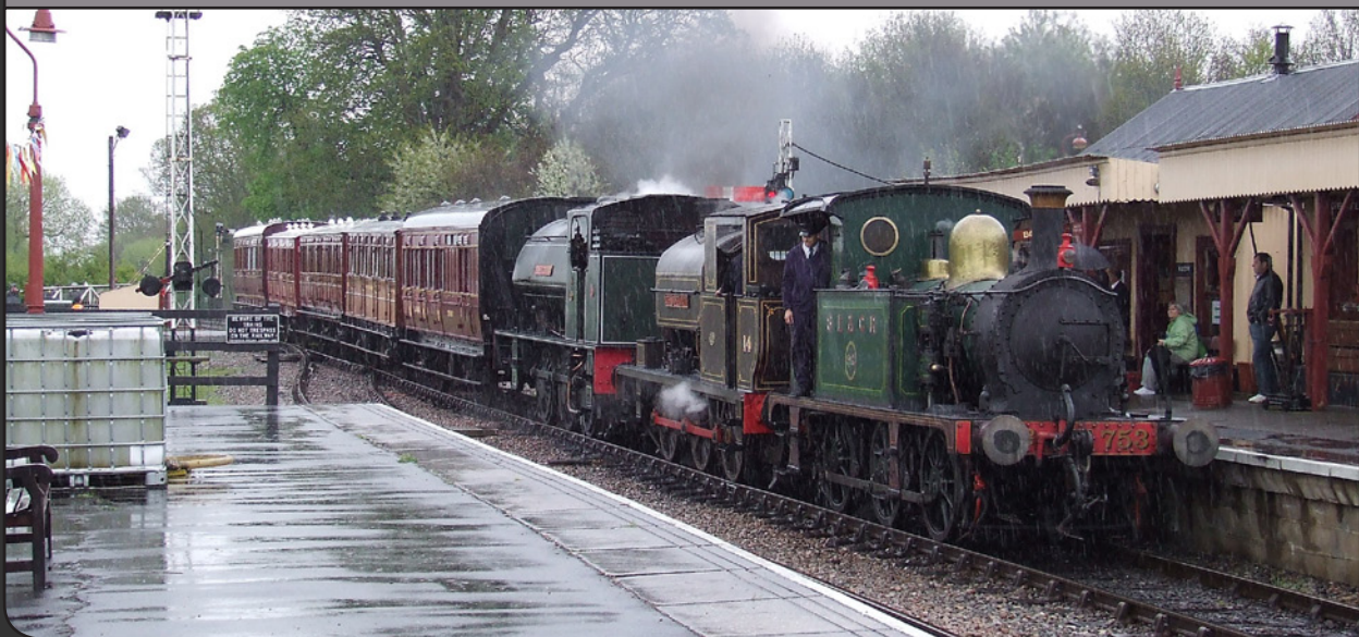
Above: The Kent & East Sussex Railway gala over the Bank Holiday Weekend at the start of May had as one of the star attractions BR Standard 4MT Tank No. 80072, visiting from the Llangollen Railway in Wales. Craig Stretten