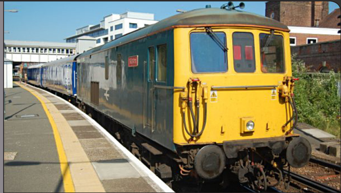
Above: Class 73 141 "Charlotte" and 73 208 "Kirsten" sit in the beautiful sunshine in Hastings whilst working 0Y22, Tonbridge - St Leonards Depot. on June 28th.