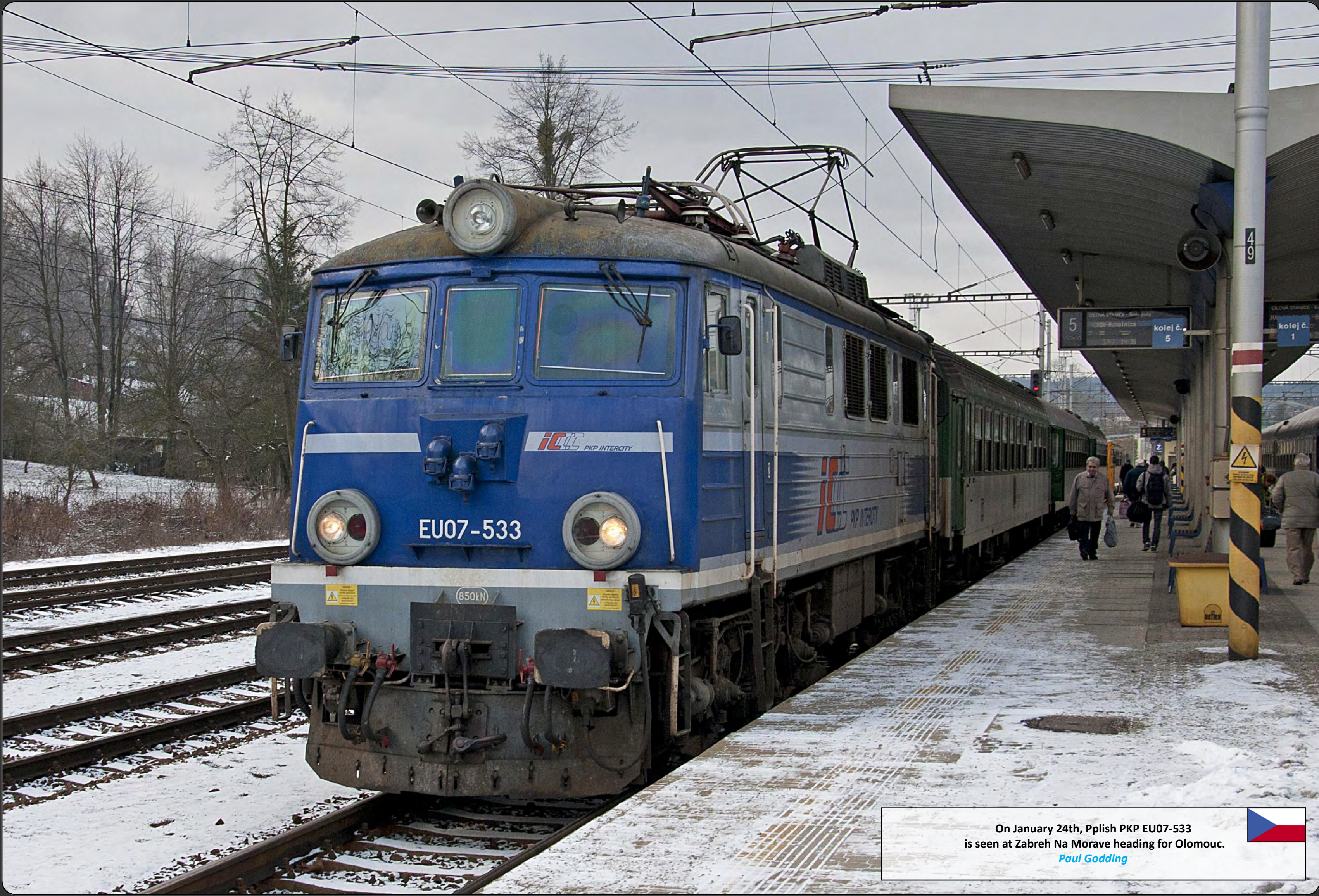
On January 24th, Pplish PKP EU07-533 is seen at Zabreh Na Morave heading for Olomouc.