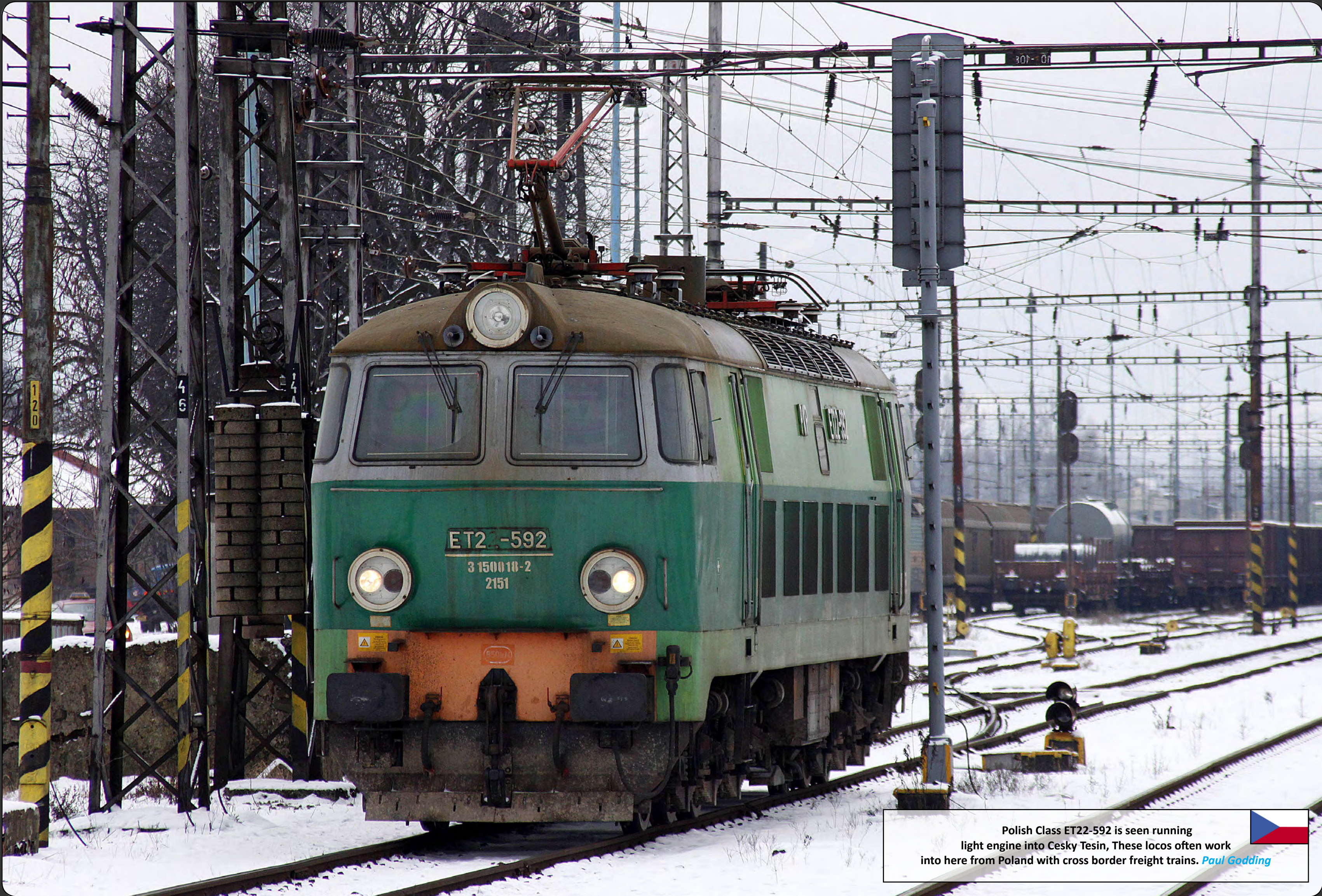
Polish Class ET22-592 is seen running light engine into Cesky Tesin, These locos often work into here from Poland with cross border freight trains. Paul Godding