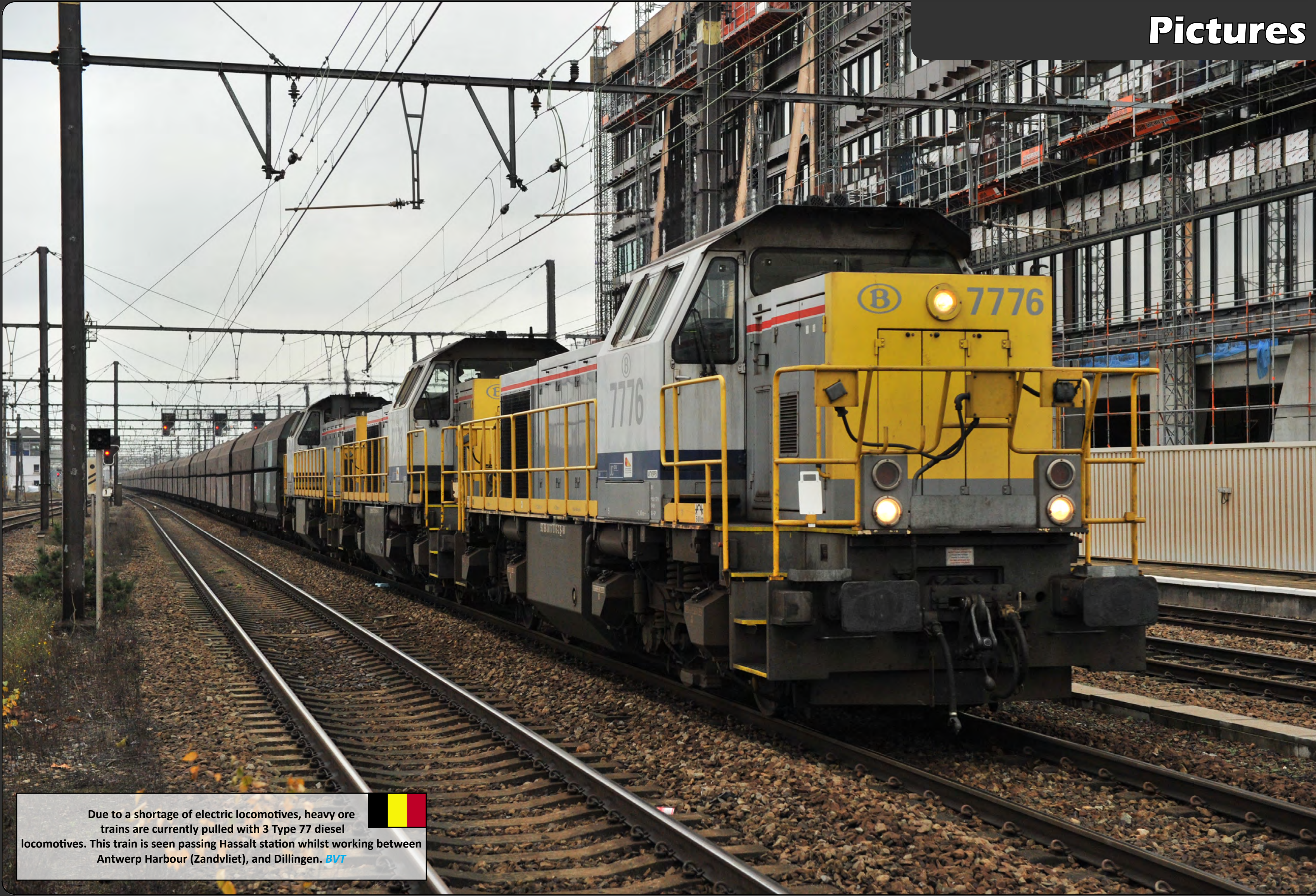
Due to a shortage of electric locomotives, heavy ore trains are currently pulled with 3 Type 77 diesel locomotives. This train is seen passing Hassalt station whilst working between Antwerp Harbour (Zandvliet), and Dillingen. BVT