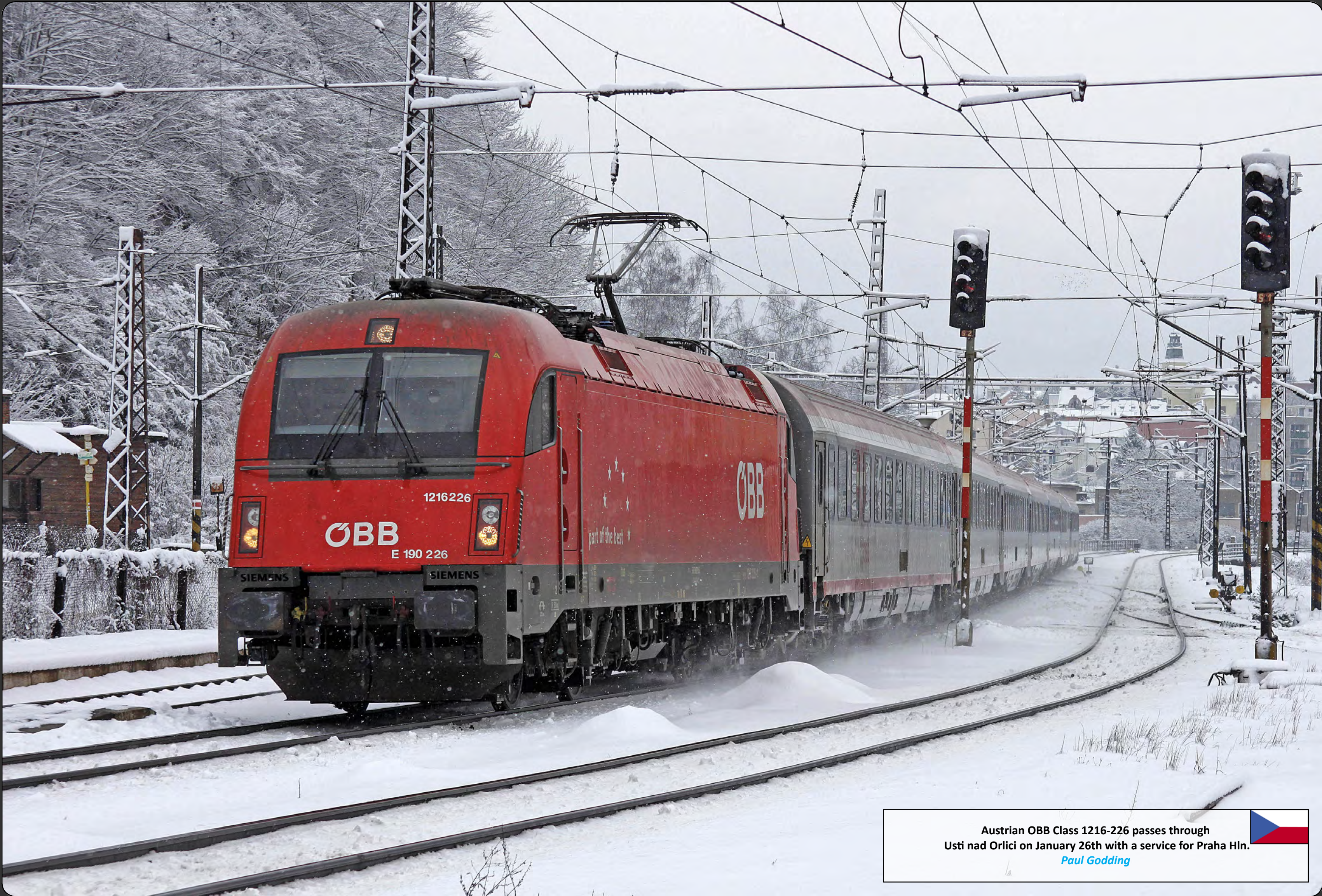
Austrian OBB Class 1216-226 passes through Usti nad Orlici on January 26th with a service for Praha Hln.