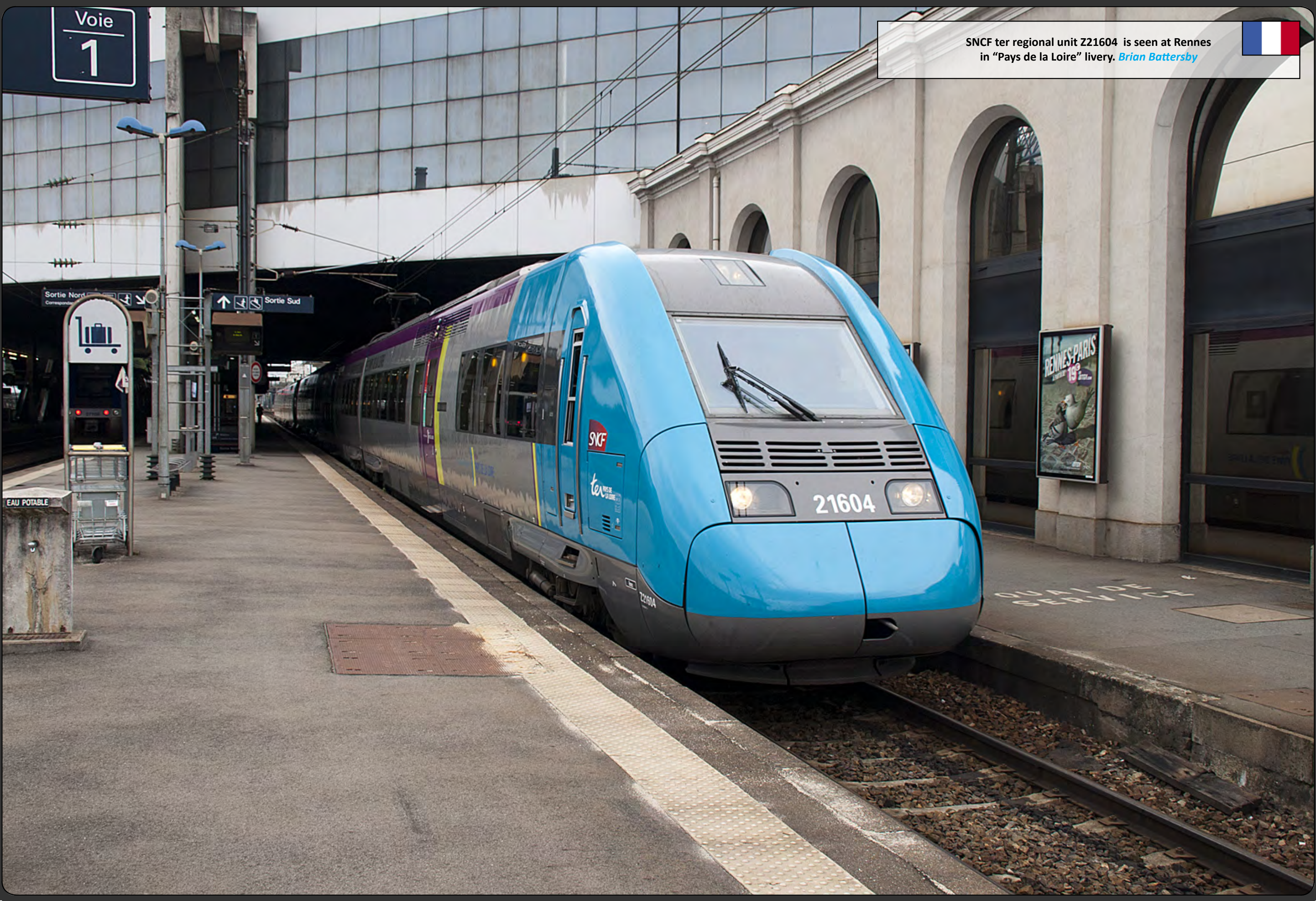
SNCF ter regional unit Z21604 is seen at Rennes in "Pays de la Loire" livery. Brian Battersby