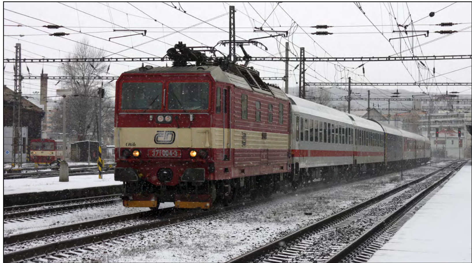
Above: The small batch of Class 371s ply the route from Praha through Decin and into Dresden, here Class 371.004 passes Kralupy en route Praha. Below: Seen at Ostrava depot on January 25th are Class 751.038 and 751.176.