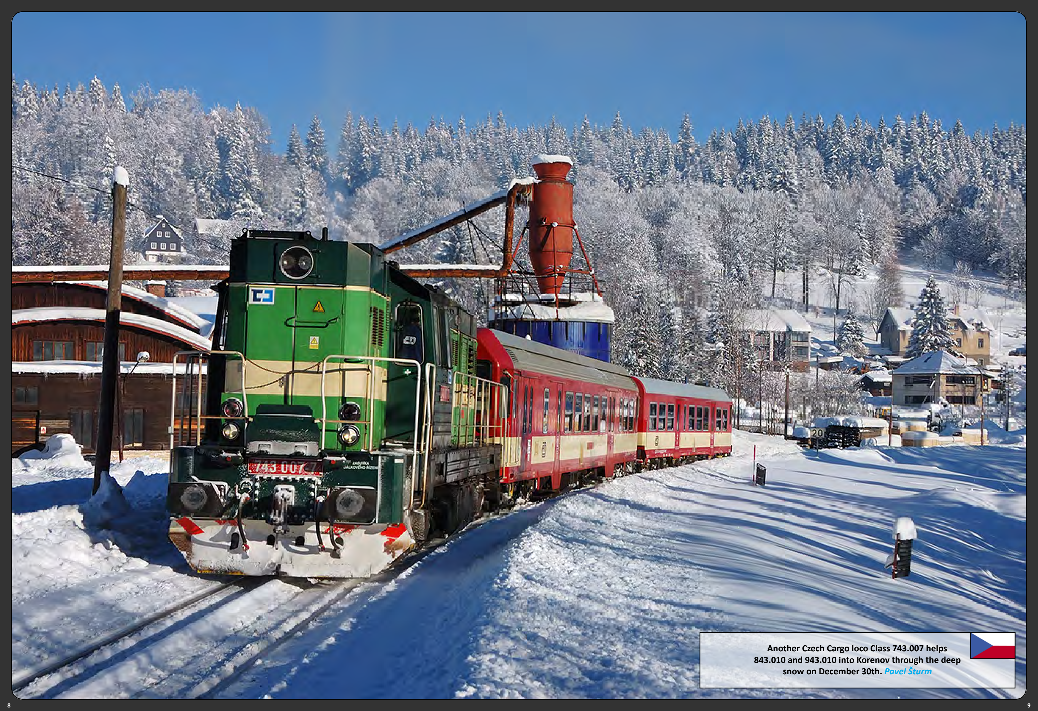
Another Czech Cargo loco Class 743.007 helps 843.010 and 943.010 into Korenov through the deep snow on December 30th.