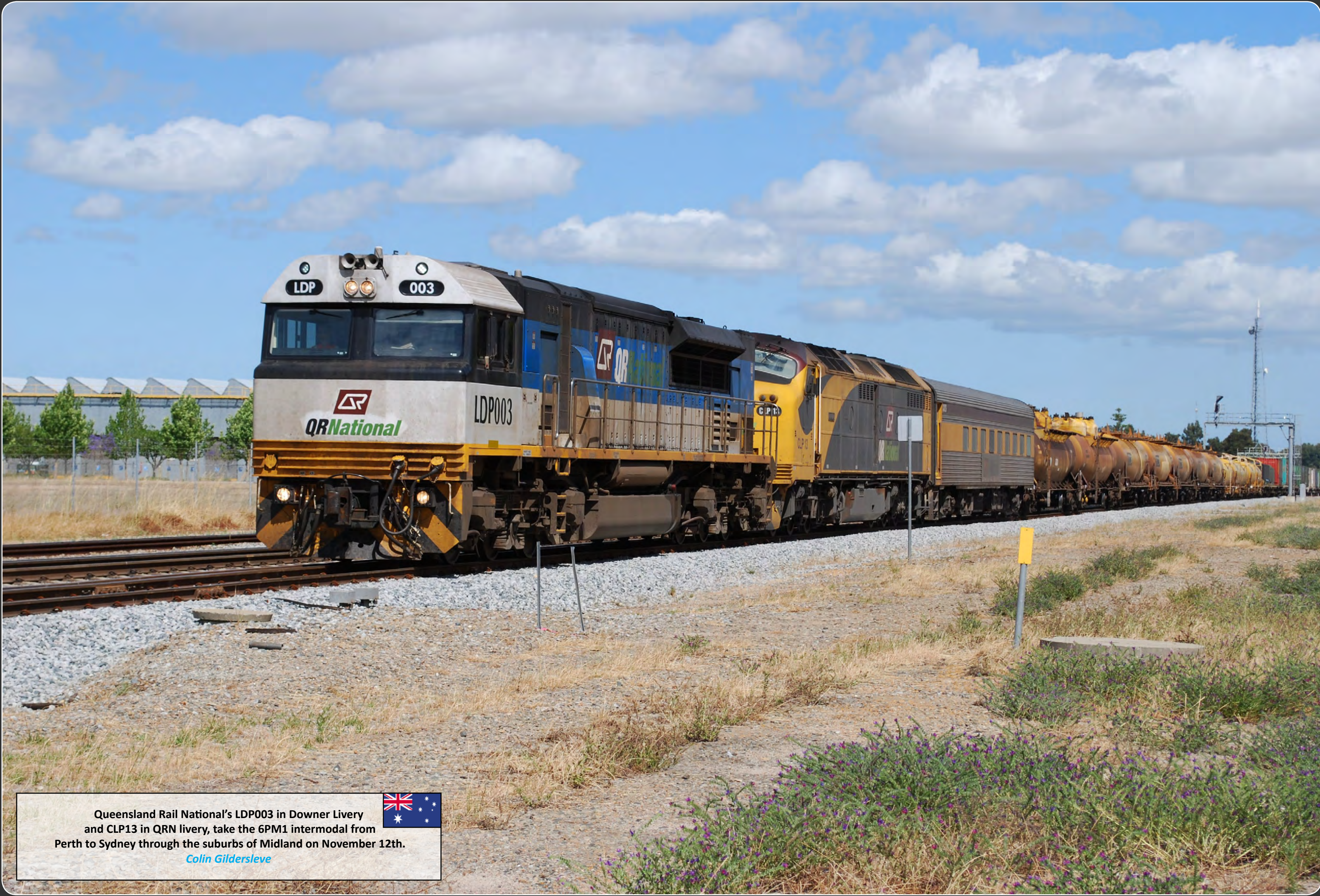
Queensland Rail National's LDP003 in Downer Livery and CLP13 in QRN livery, take the 6PM1 intermodal from Perth to Sydney through the suburbs of Midland on November 12th.