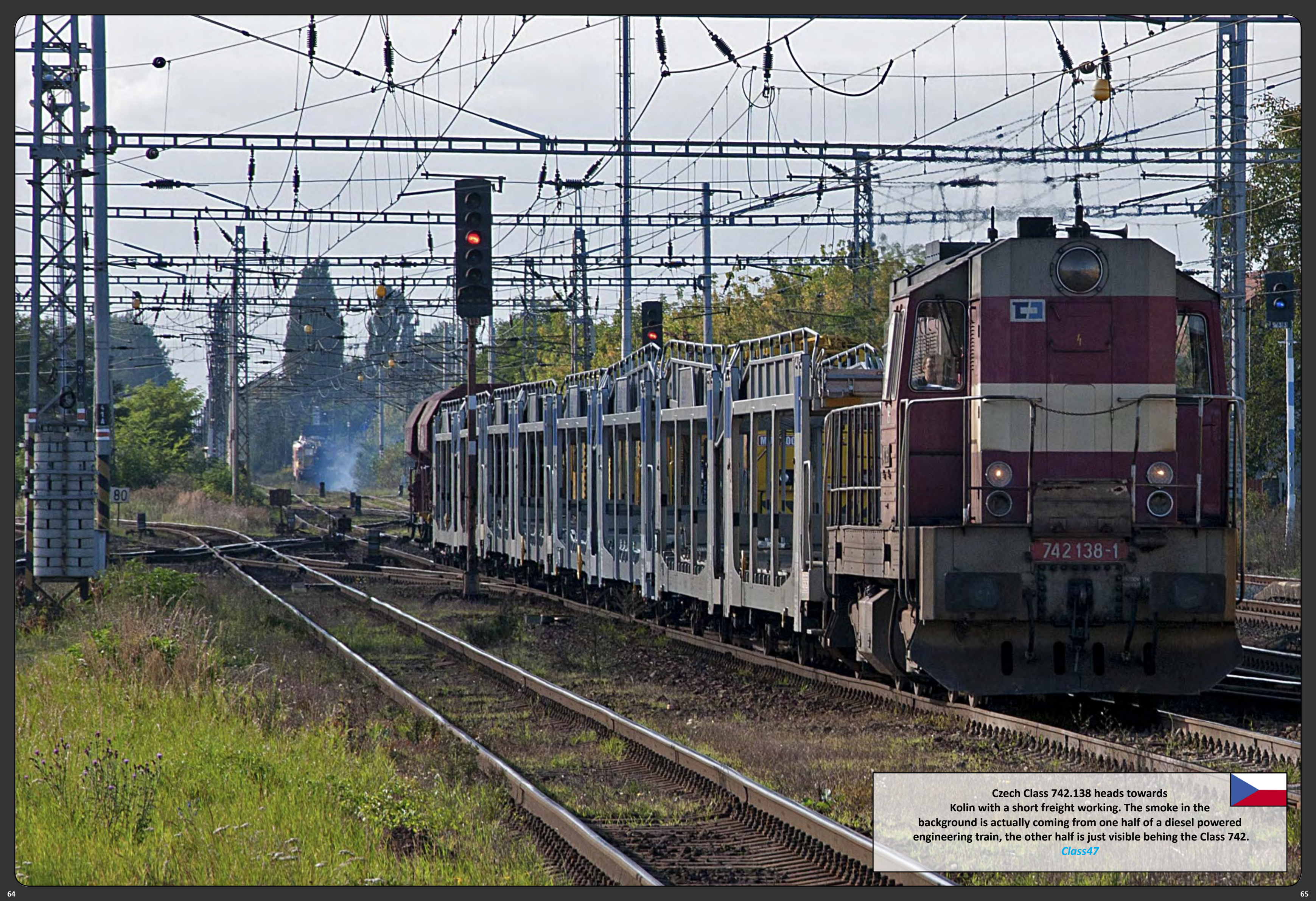
Czech Class 742.138 heads towards Kolin with a short freight working. The smoke in the background is actually coming from one half of a diesel powered engineering train, the other half is just visible behind the Class 742.