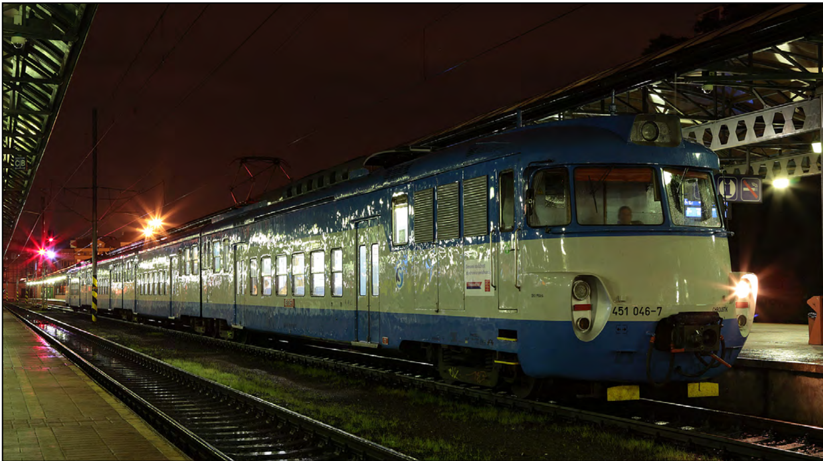
Above: Czech Class 451.046 is seen at Praha Hln. having just arrived with a local working from Praha Vršovice. Below: Heading a pair of Unipetrol Doprava Class 740s at Kralupy nad Vltavou is Class 740.735.