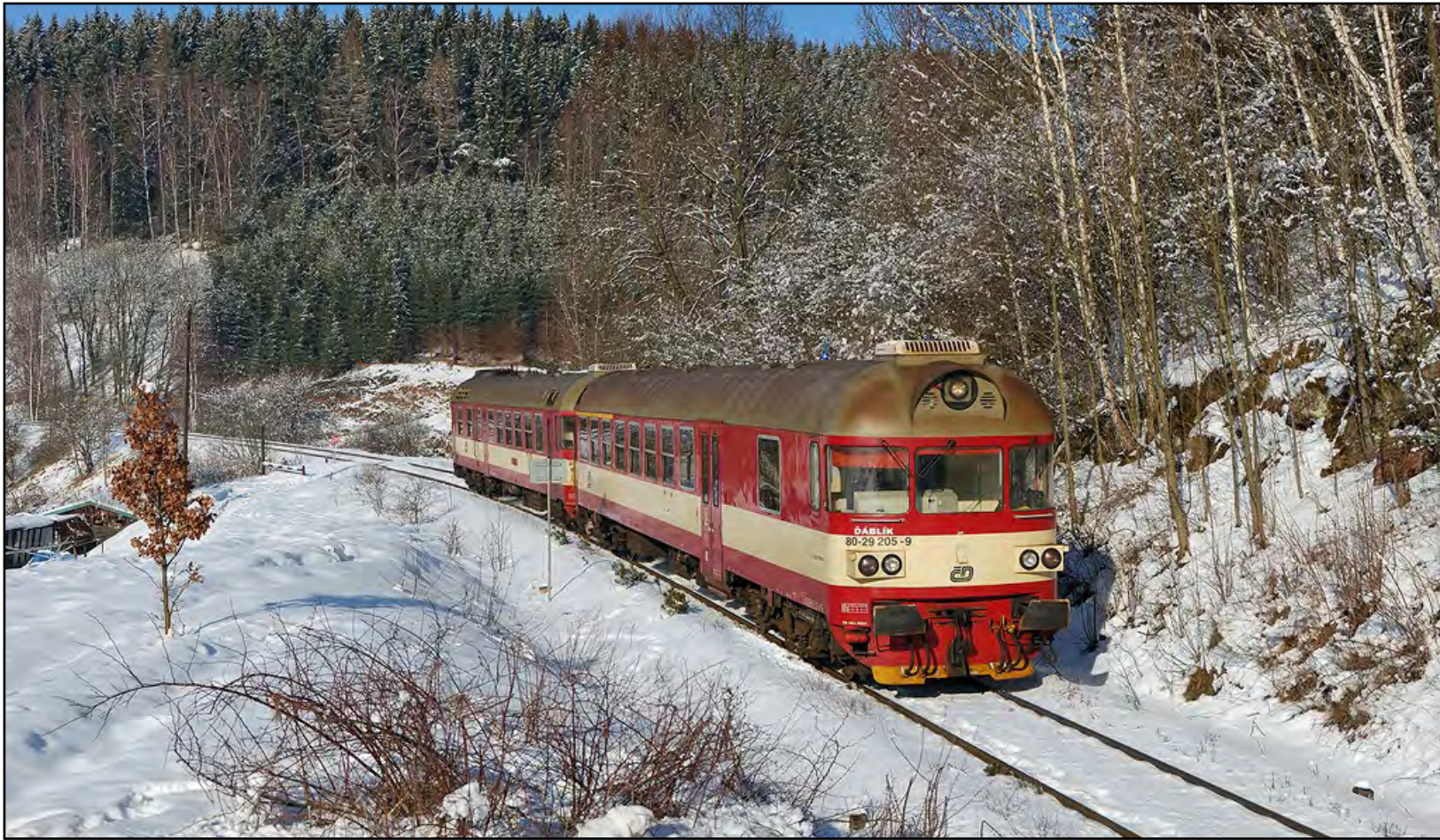
Above: Class 954.205 heads 854.213 through Stara Paka on January 29th with service Sp1868 from Trutnov to Kolin. Below: Class 854.212 passes through Stara Paka with service Os5412 heading for Liberec on January 29th.