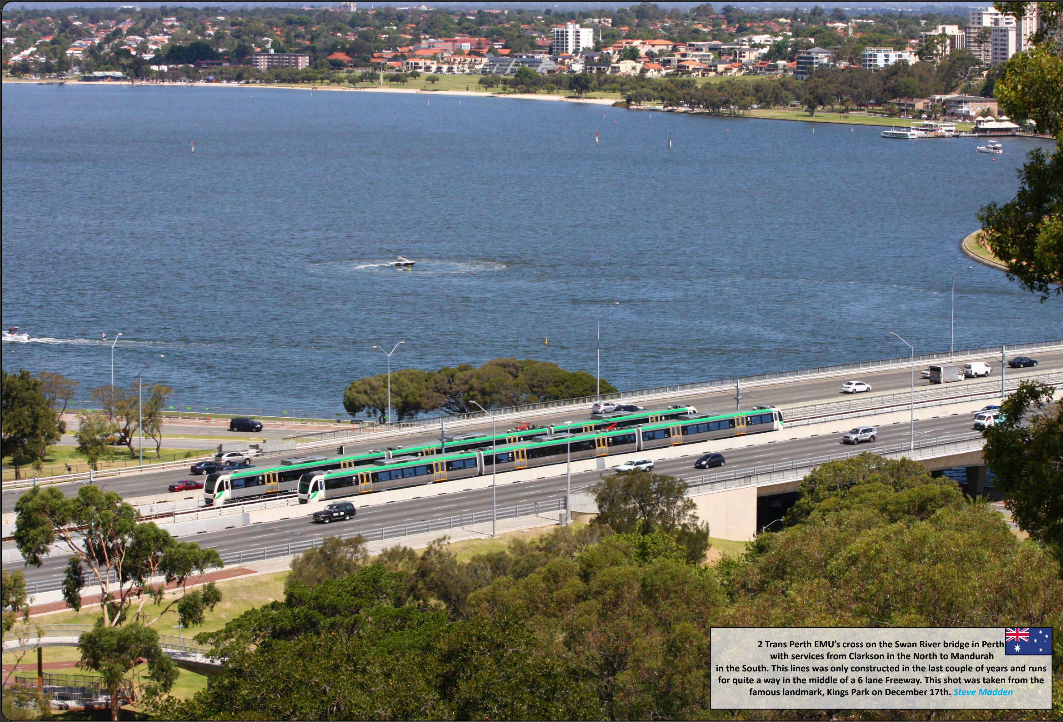
2 Trans Perth EMU's cross on the Swan River bridge in Perth with services from Clarkson in the North to Mandurah in the South. This lines was only constructed in the last couple of years and runs for quite a way in the middle of a 6 lane Freeway. This shot was taken from the famous landmark, Kings Park on December 17th.