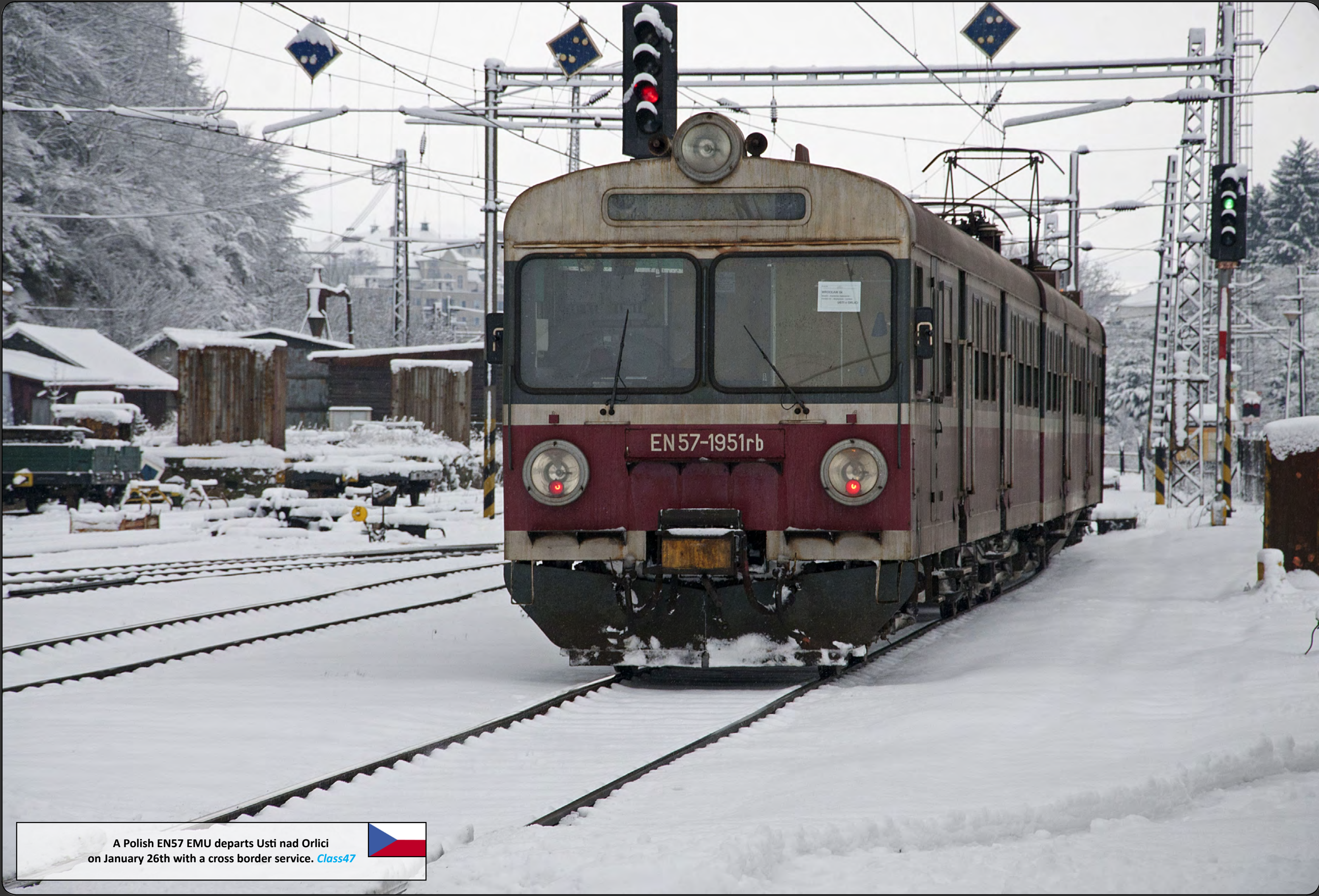
A Polish EN57 EMU departs Usti nad Orlici on January 26th with a cross border service. Class47