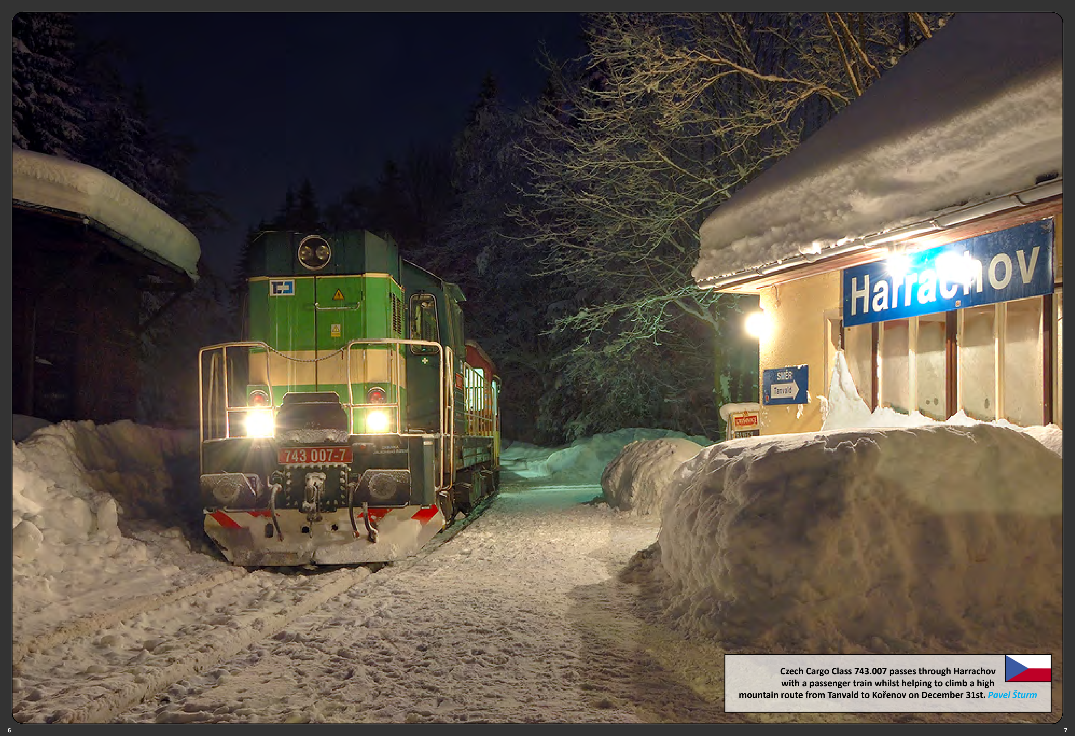
Czech Cargo Class 743.007 passes through Harrachov with a passenger train whilst helping to climb a high mountain route from Tanvald to Kořenov on December 31st.