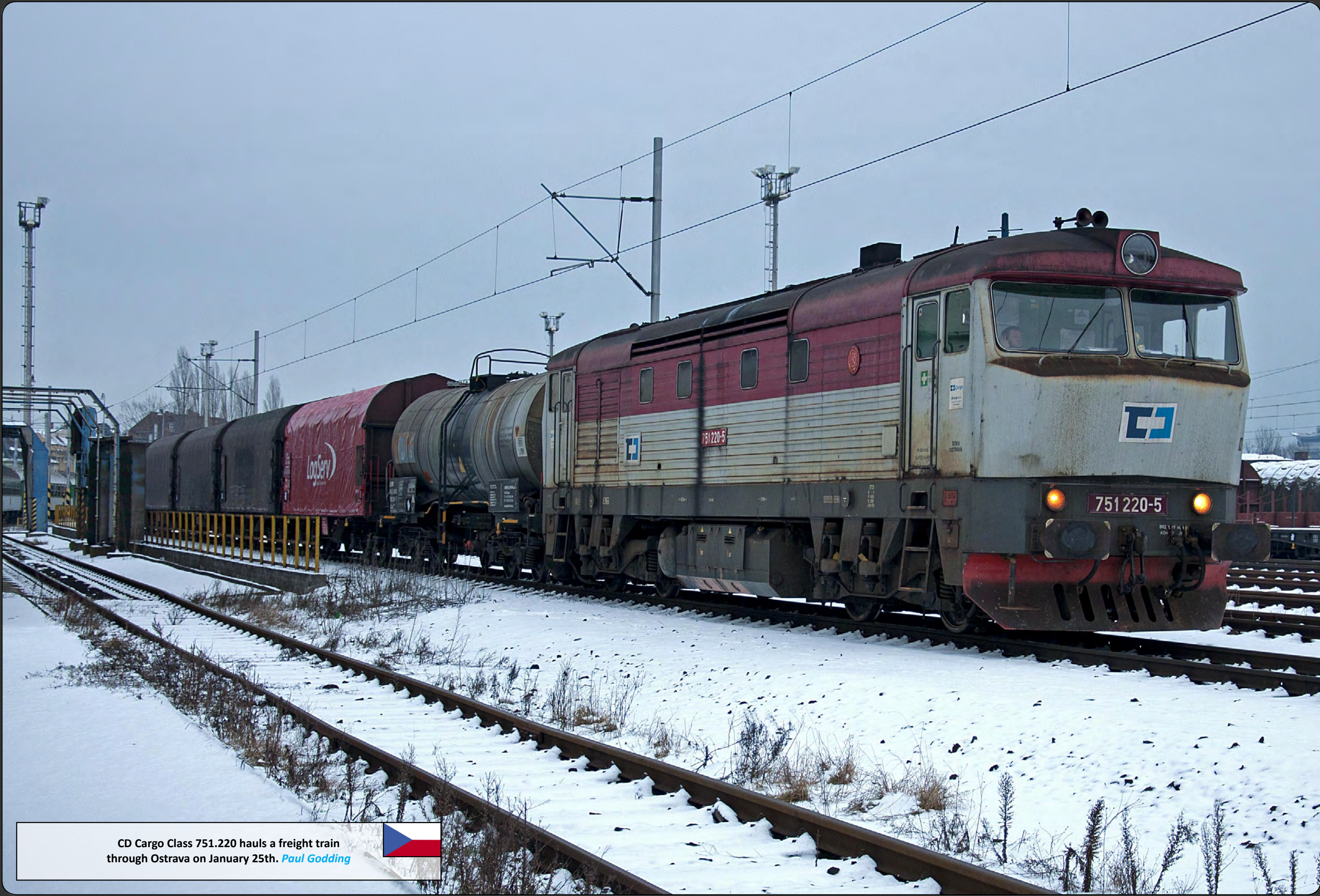
CD Cargo Class 751.220 hauls a freight train through Ostrava on January 25th. Paul Godding