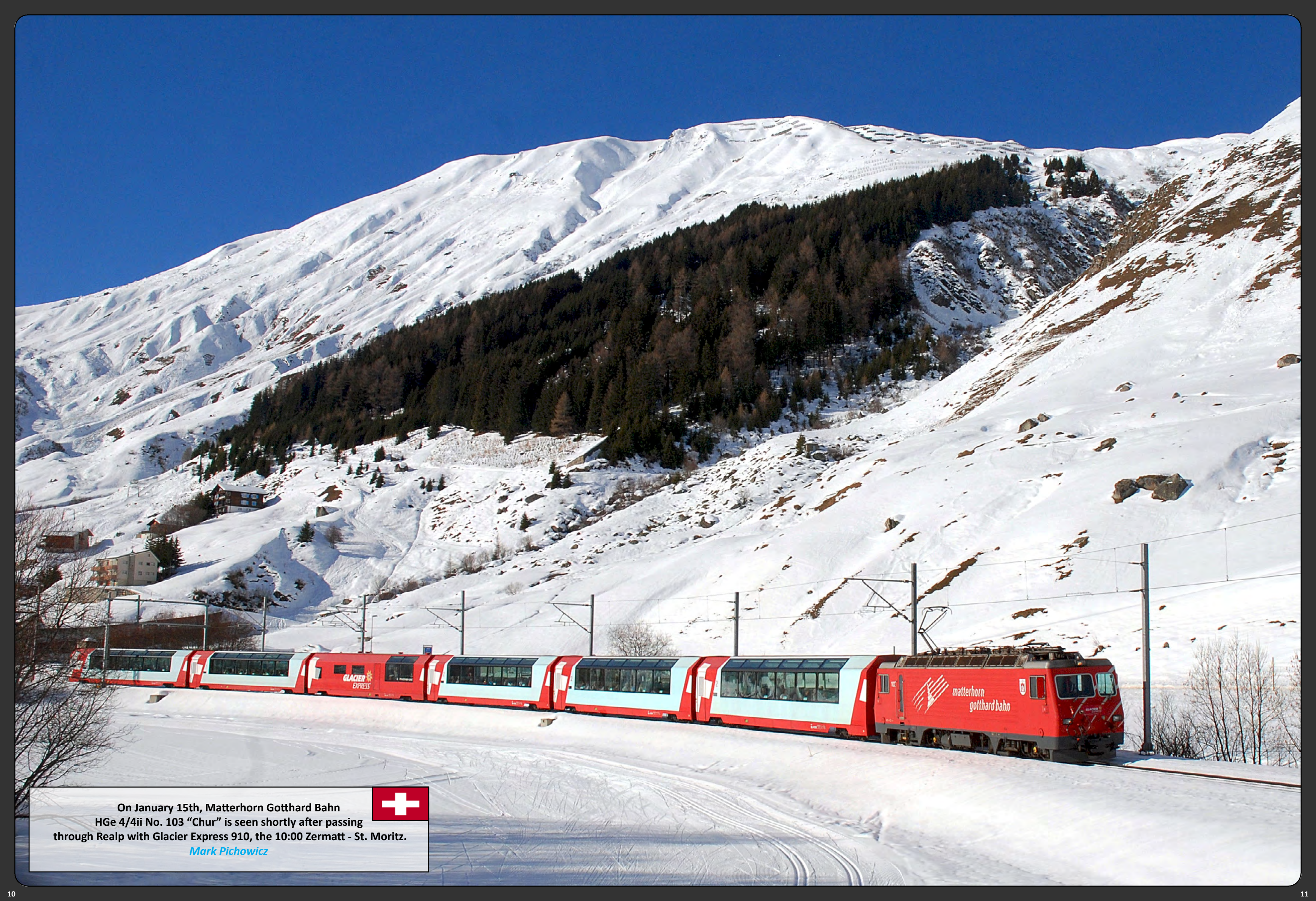
On January 15th, Matterhorn Gotthard Bahn HGe 4/4ii No. 103 "Chur" is seen shortly after passing through Realp with Glacier Express 910, the 10:00 Zermatt - St. Moritz.