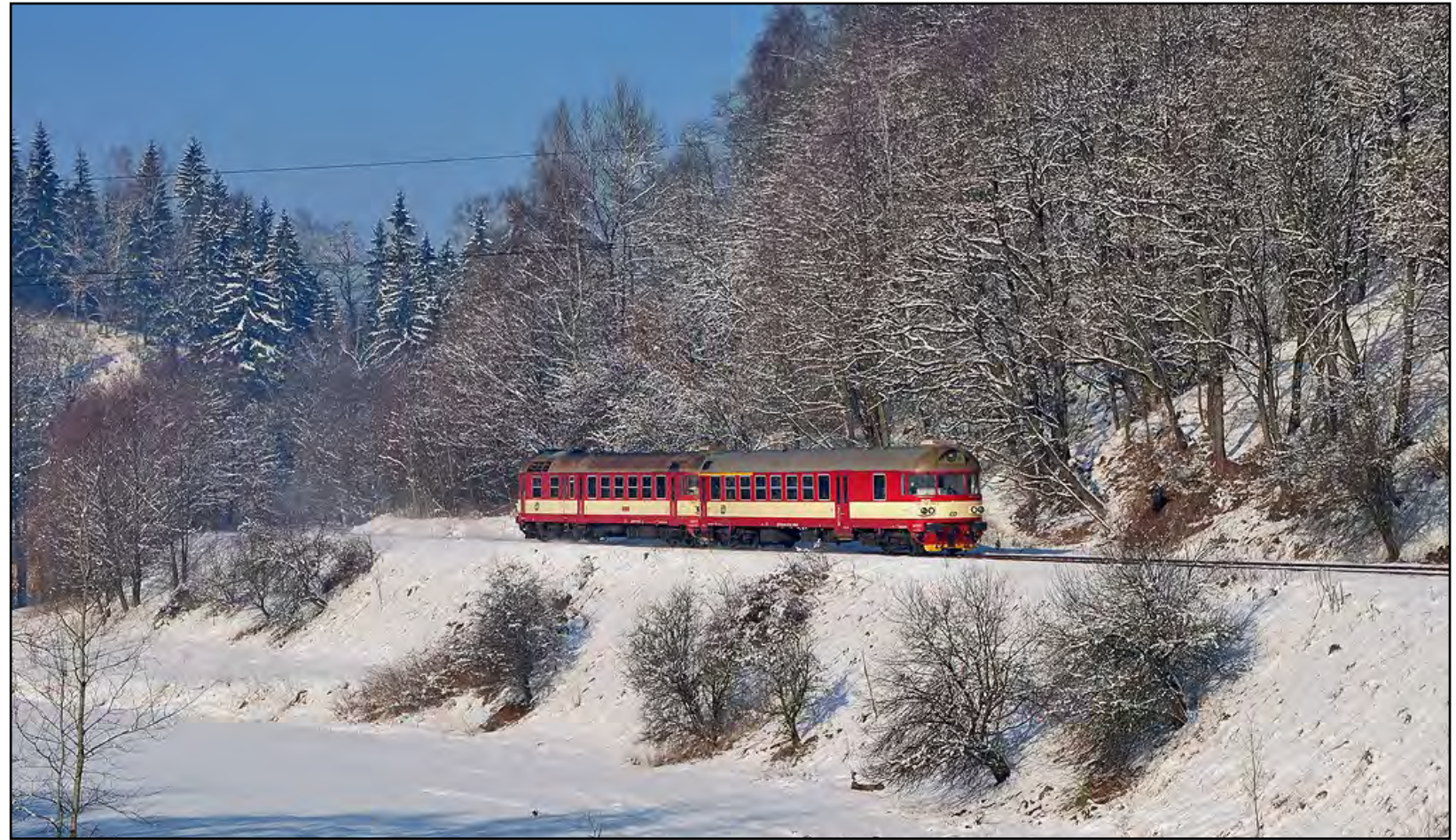
Above: Class 954.214 leads 854.205 through Stara Paka with service Sp1866 from Trutnov on January 29th. Pavel Šturm Below: Class 843.014 heads through Stara Paka with R989 from Liberec on January 29th. Pavel Šturm