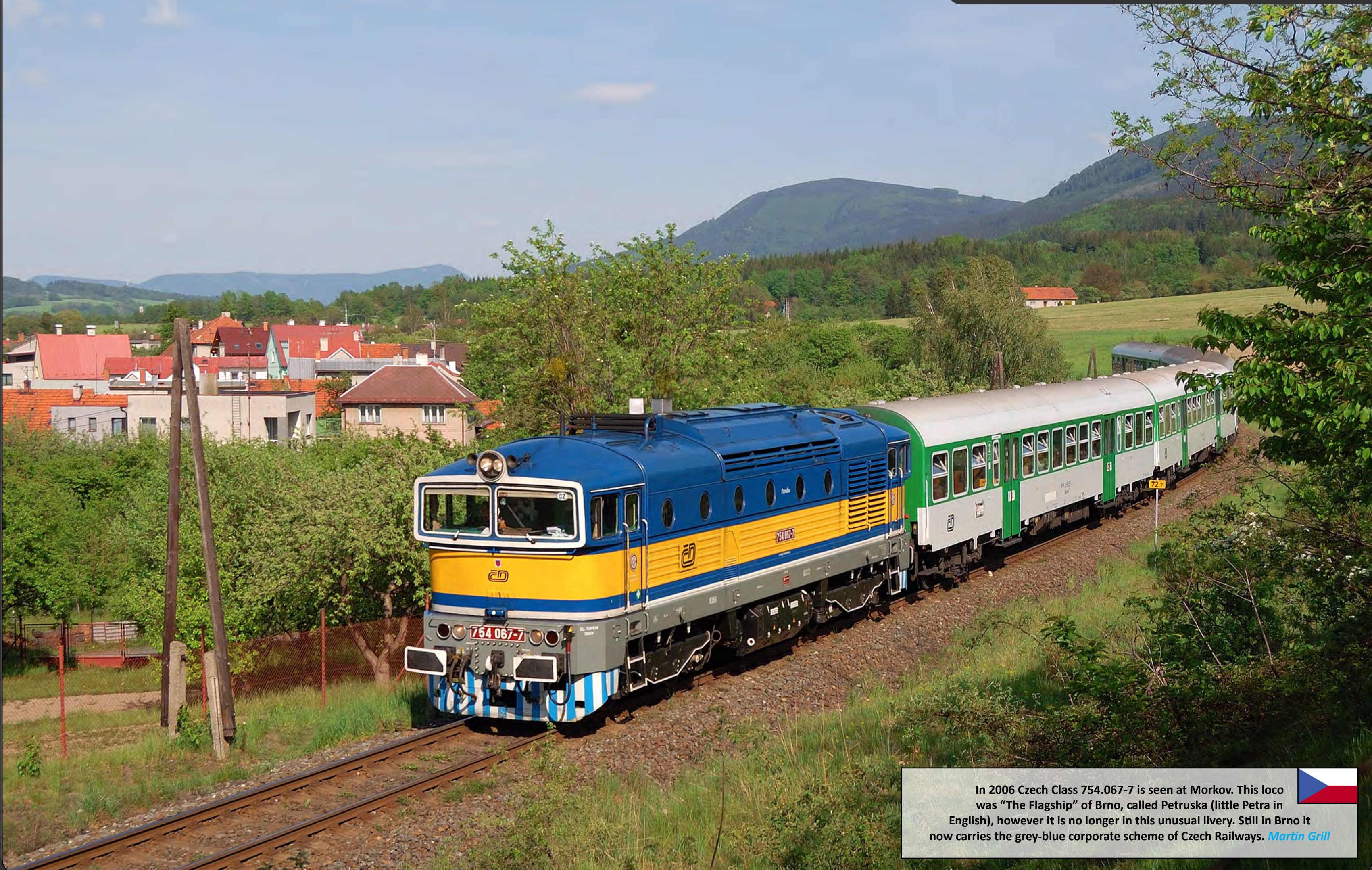
In 2006 Czech Class 754.067-7 is seen at Morkov. This loco was “The Flagship” of Brno, called Petruska (little Petra in English), however it is no longer in this unusual livery. Still in Brno it now carries the grey-blue corporate scheme of Czech Railways.