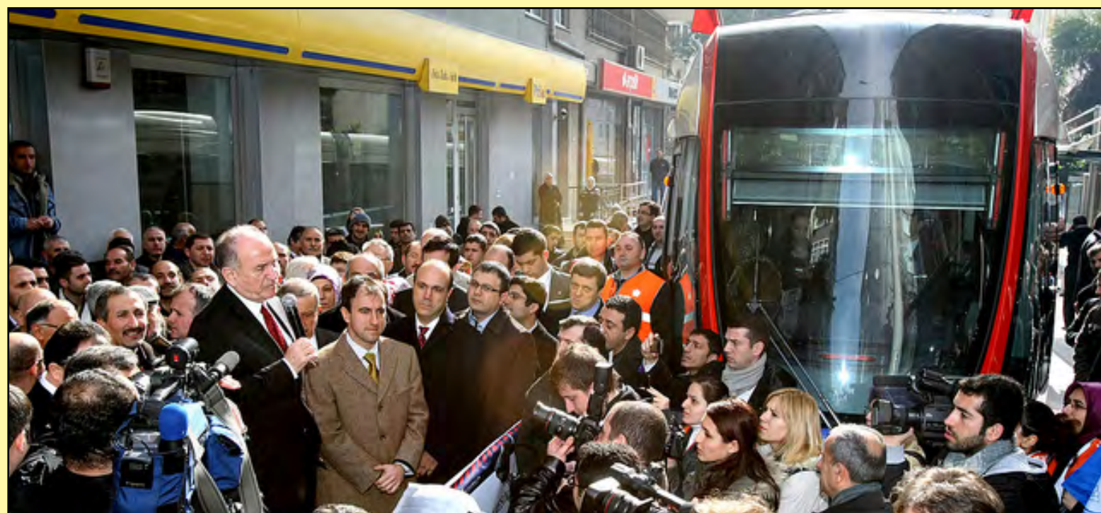
Photo: Mr. Kadir Topbaş, Mayor of Istanbul, at the inauguration of the Citadis tramways of Istanbul – 3 February 2011.

Alstom started its activities in the 1950s, and is a key contributor to the energy and rail transport infrastructure in Turkey. Alstom supplied key equipment for 55% of Turkey's installed power generation capacity, including the Atatürk dam which is the biggest hydro power plant in the country and approximately 50 % of the installed transmission products of TEIAS and successfully performed several key railway projects such as the delivery of 436 locomotives for the National Railways and the Istanbul tramway. Alstom is today a social and economical contributor, with approximately 1200 employees in Turkey working for commercial, engineering, service and manufacturing, able to manage turnkey transmission projects for the entire region in power generation and in power transmission. The Gebze factory exports 85% of its production and Alstom Grid has been ranked 39th among the top 500 national companies.