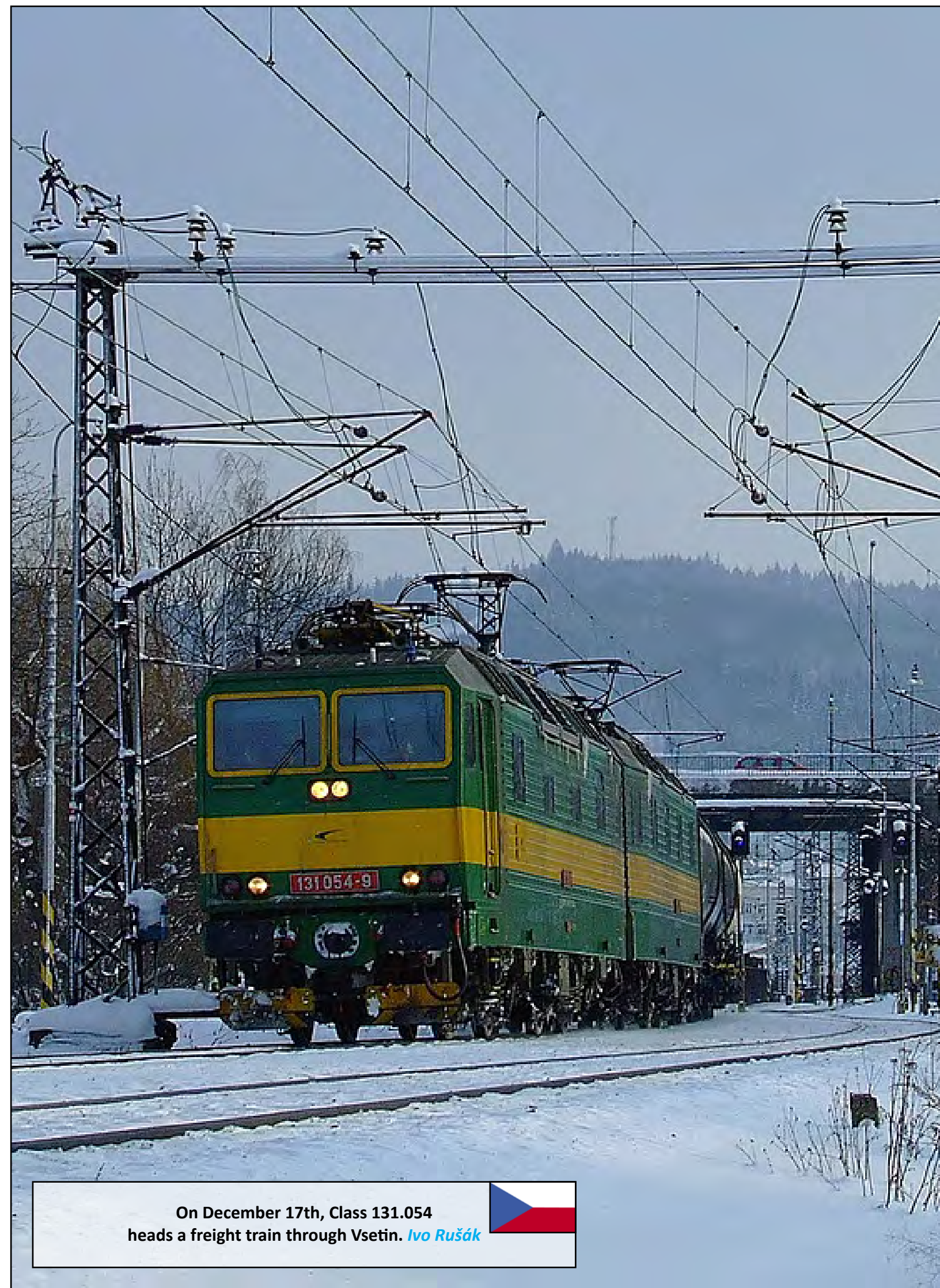
On December 17th, Class 131.054 heads a freight train through Vsetin. Ivo Rušák