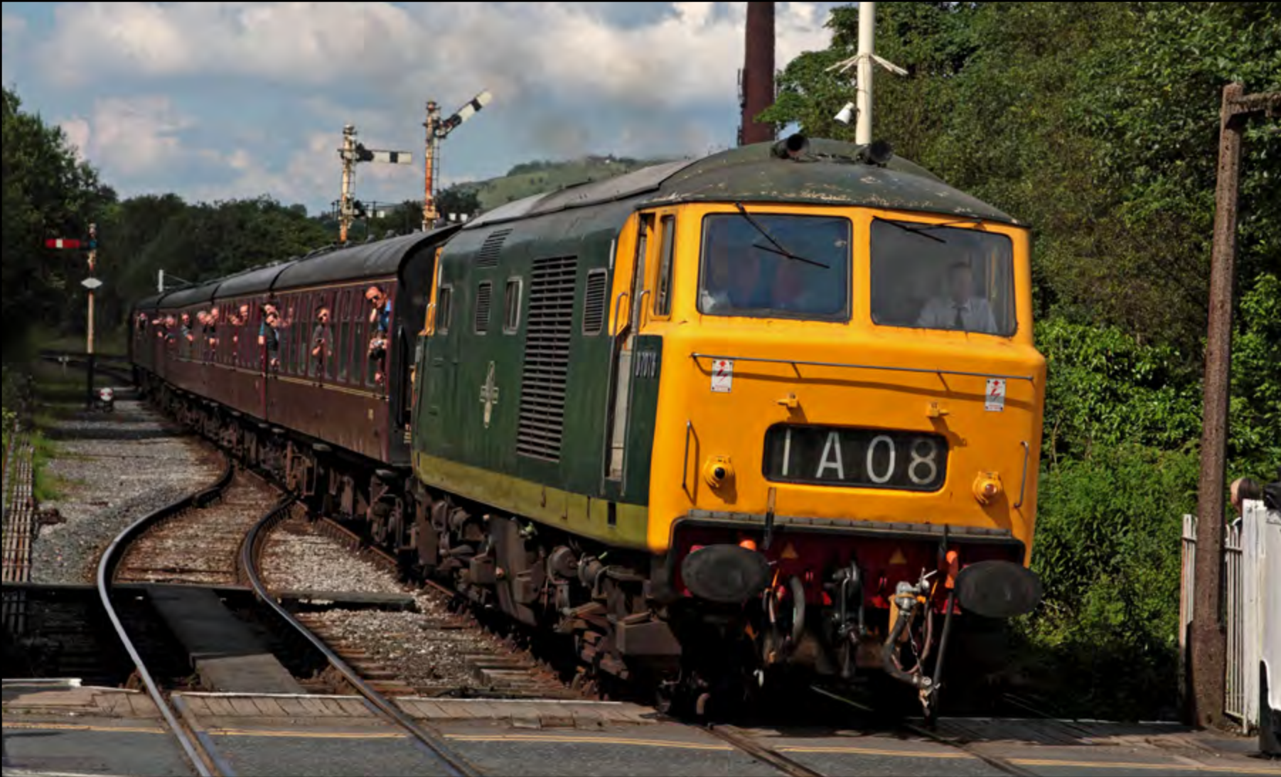
Above: Proving to be very popular, Hymek Class 35 No. D7076 approaches Ramsbottom on July 7th with a Bury bound service.