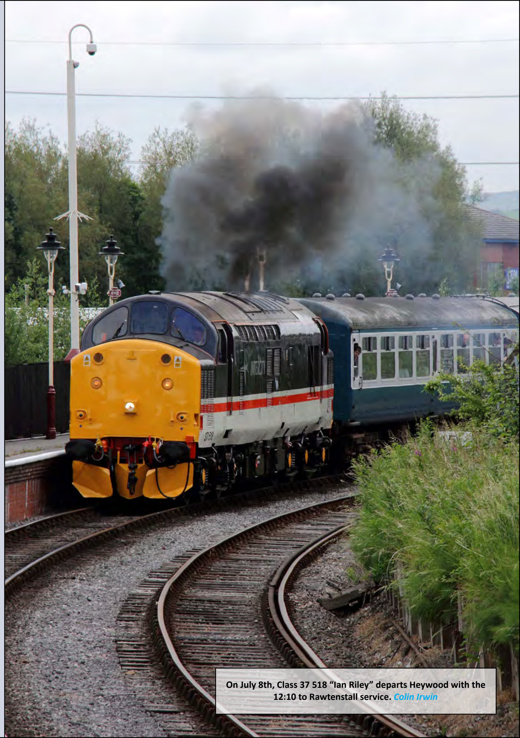
On July 8th, Class 37 518 "Ian Riley" departs Heywood with the 12:10 to Rawtenstall service.