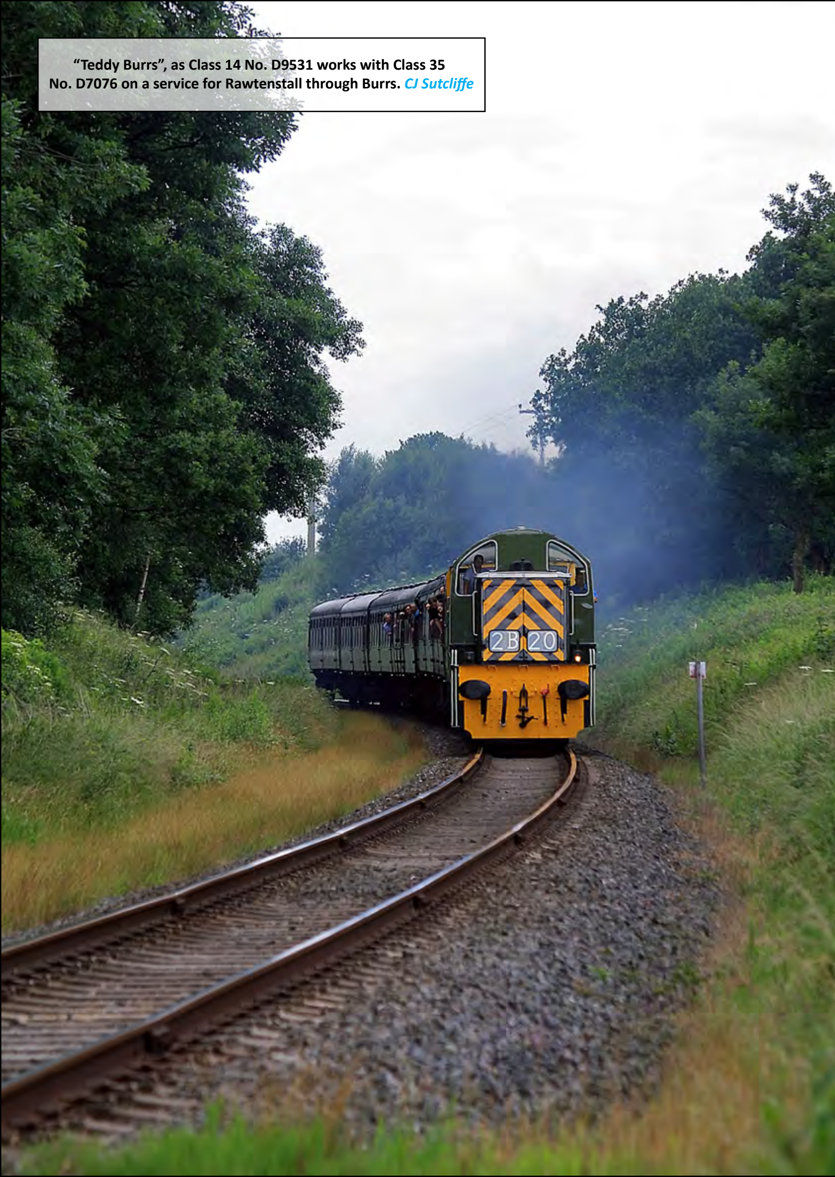
"Teddy Burrs", as Class 14 No. D9531 works with Class 35 No. D7076 on a service for Rawtenstall through Burrs. CJ Sutcliffe