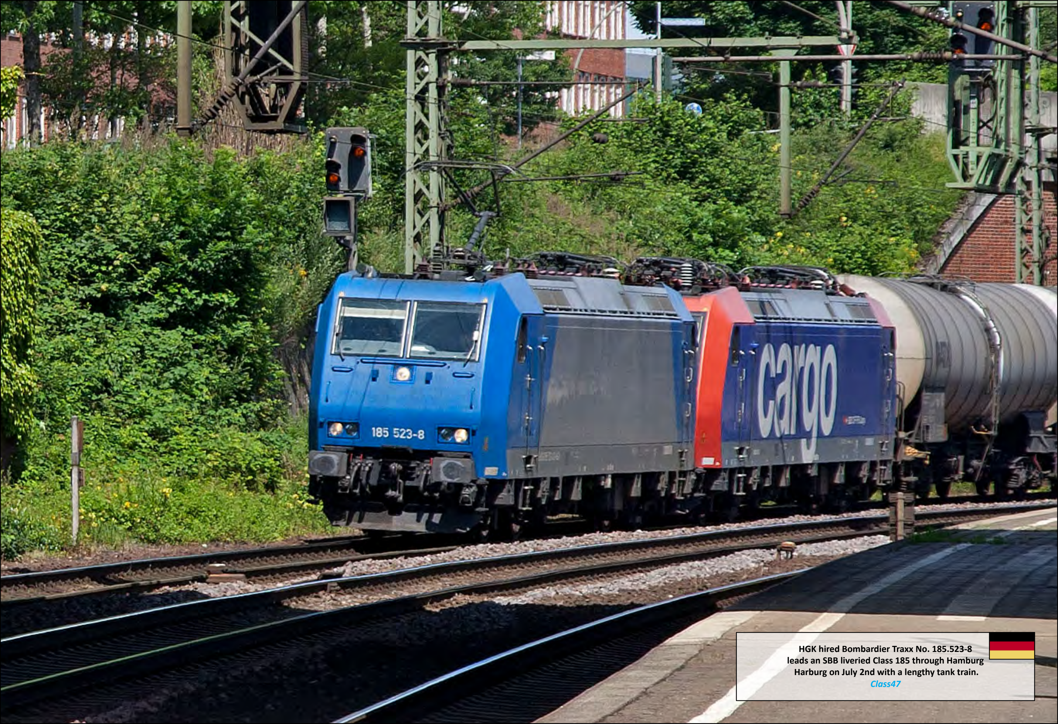
HGK hired Bombardier Traxx No. 185.523-8 leads an SBB liveried Class 185 through Hamburg Harburg on July 2nd with a lengthy tank train.