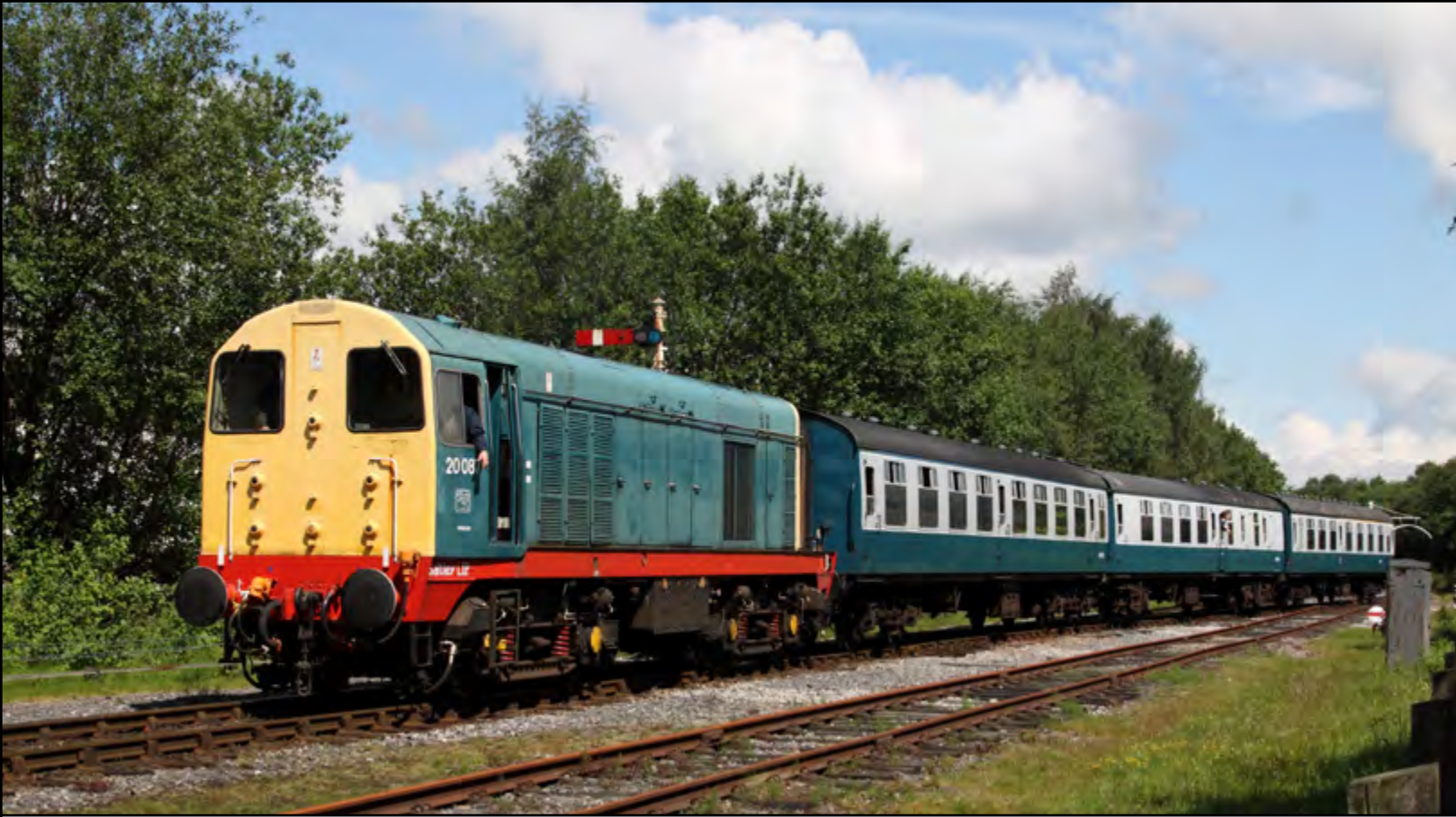
Above: Class 20 087 arrives into Ramsbottom with the stock for the local service on July 7th.