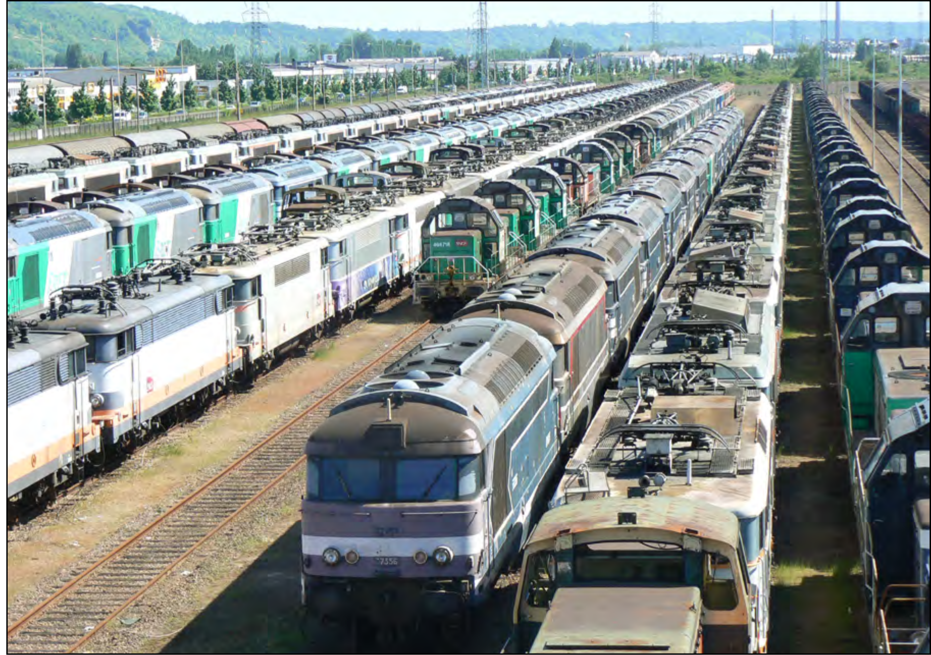
This Page: The yard at Sotteville les Rouen has become a huge storage location for SNCF locos. Here we have a selection of what can be seen. Derek Neesham