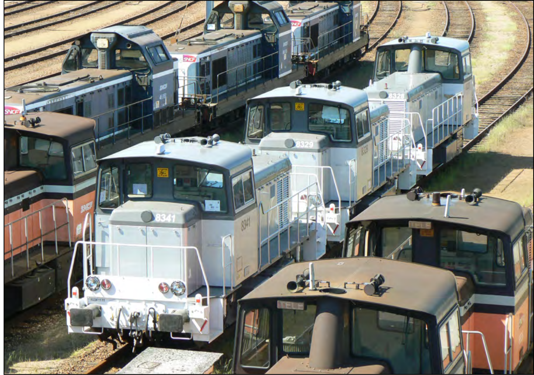
This Page: Some more pics from the yard at Sotteville les Rouen, showing some more of the stored locos at this location. Derek Neesham