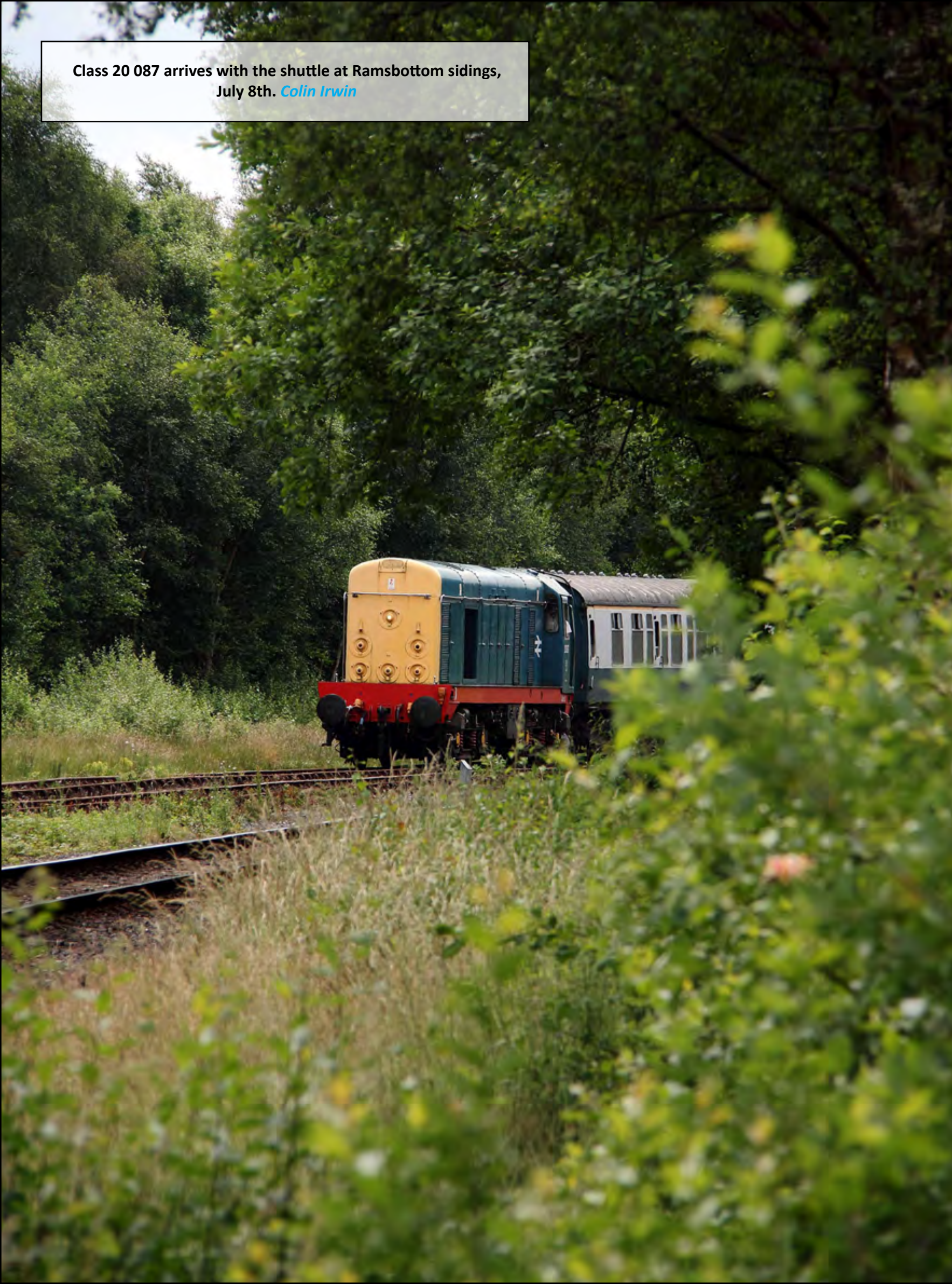
Class 20 087 arrives with the shuttle at Ramsbottom sidings, July 8th.