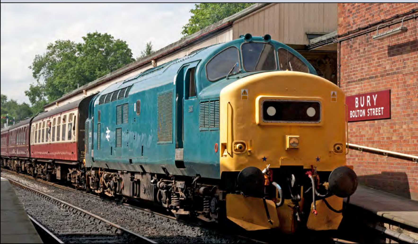
Below: Class 37 275 waits to depart Bury Bolton St. with a Rawtenstall working.