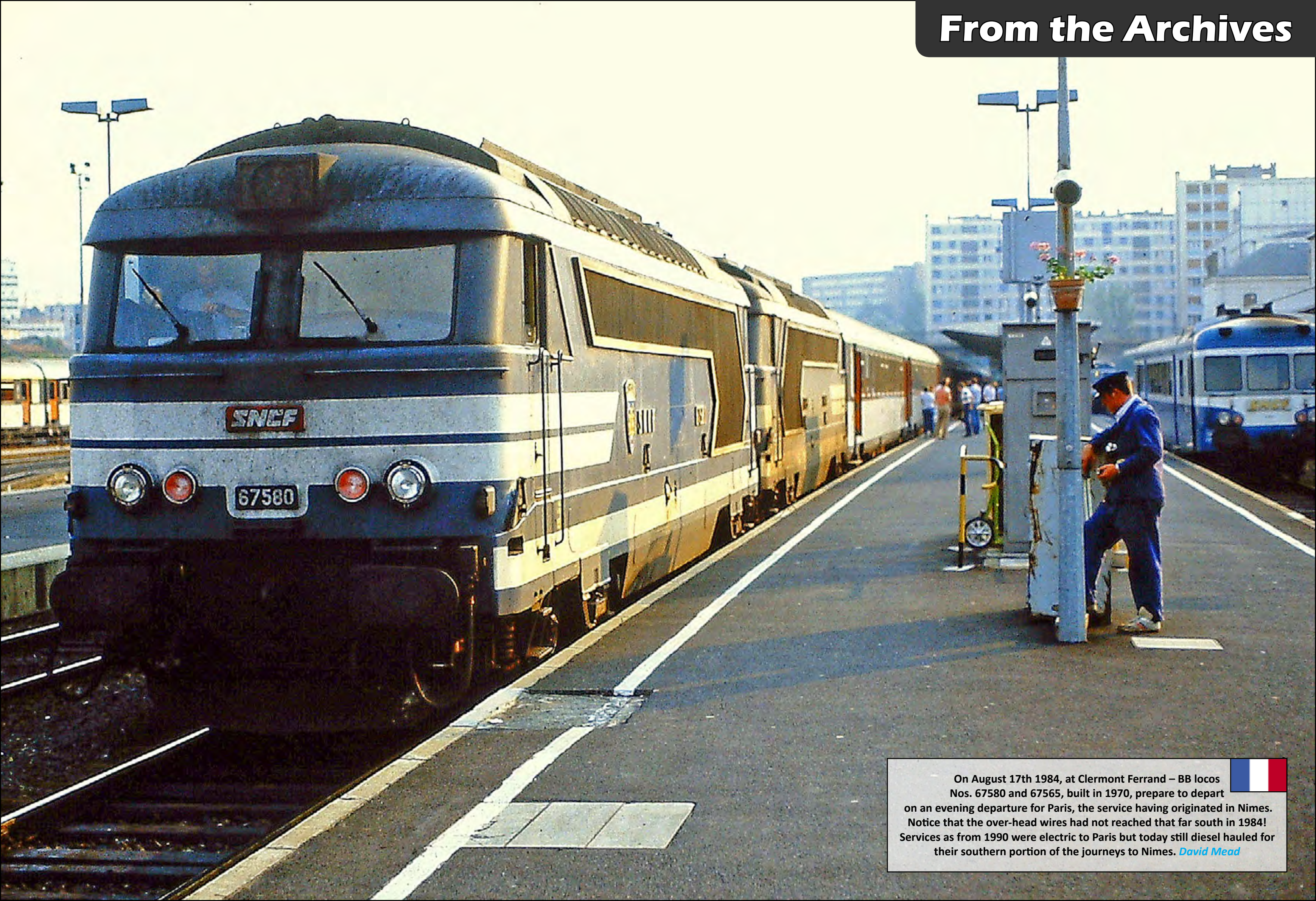
On August 17th 1984, at Clermont Ferrand – BB locos Nos. 67580 and 67565, built in 1970, prepare to depart on an evening departure for Paris, the service having originated in Nîmes. Notice that the over-head wires had not reached that far south in 1984! Services as from 1990 were electric to Paris but today still diesel hauled for their southern portion of the journeys to Nîmes.