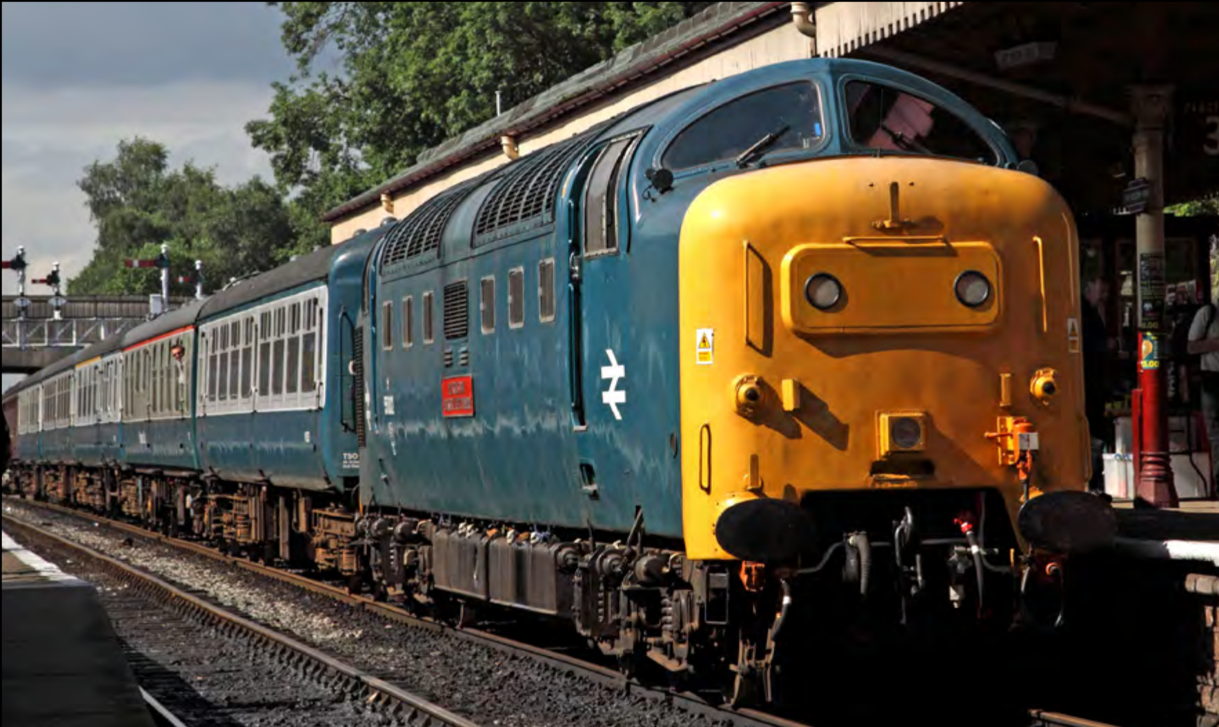
Above: Deltic Class 55 002 "The Kings Own Yorkshire Light Infantry" is seen ready to depart Bury with a working to Rawtenstall on July 7th.