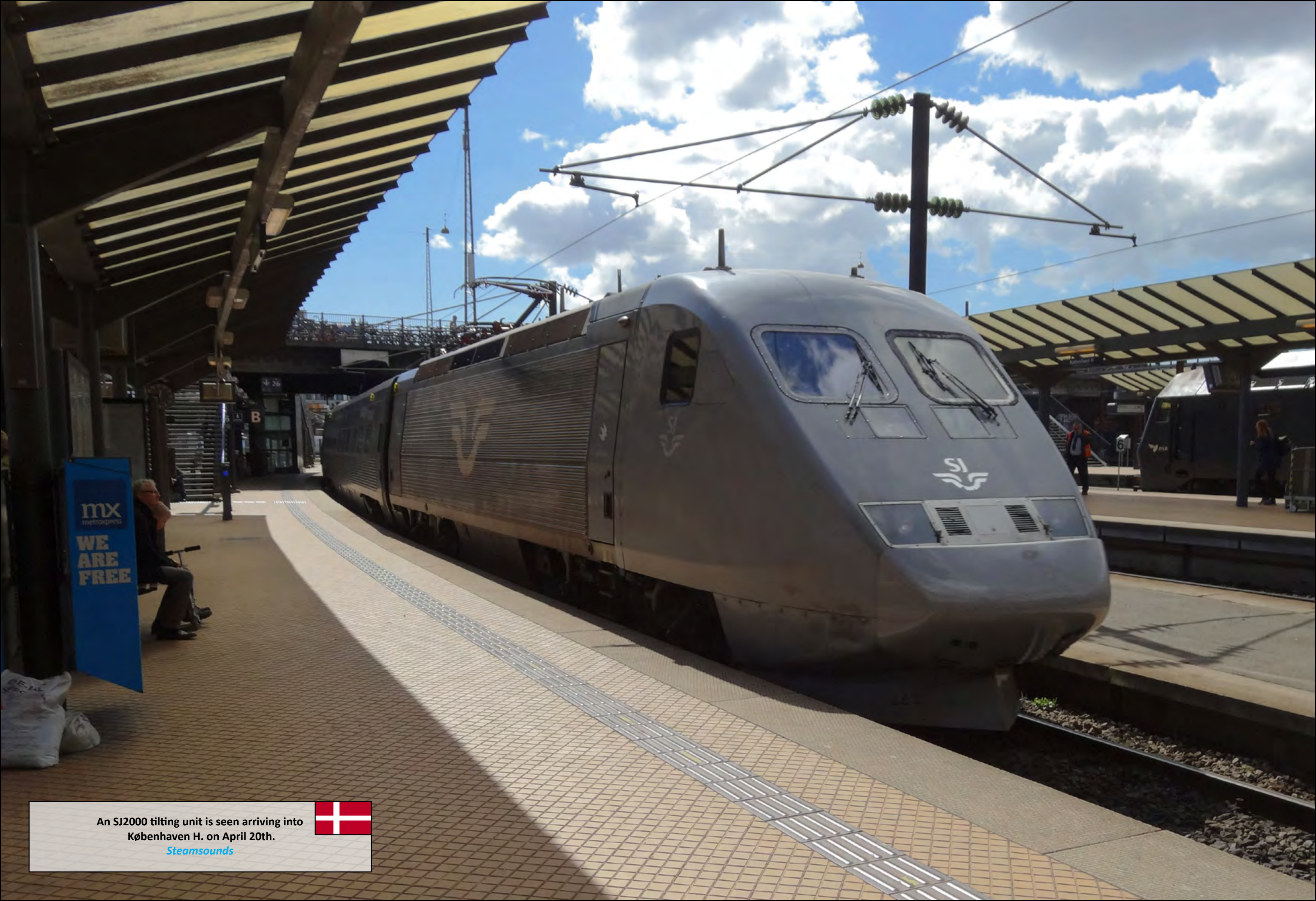
An SJ2000 tilting unit is seen arriving into København H. on April 20th.