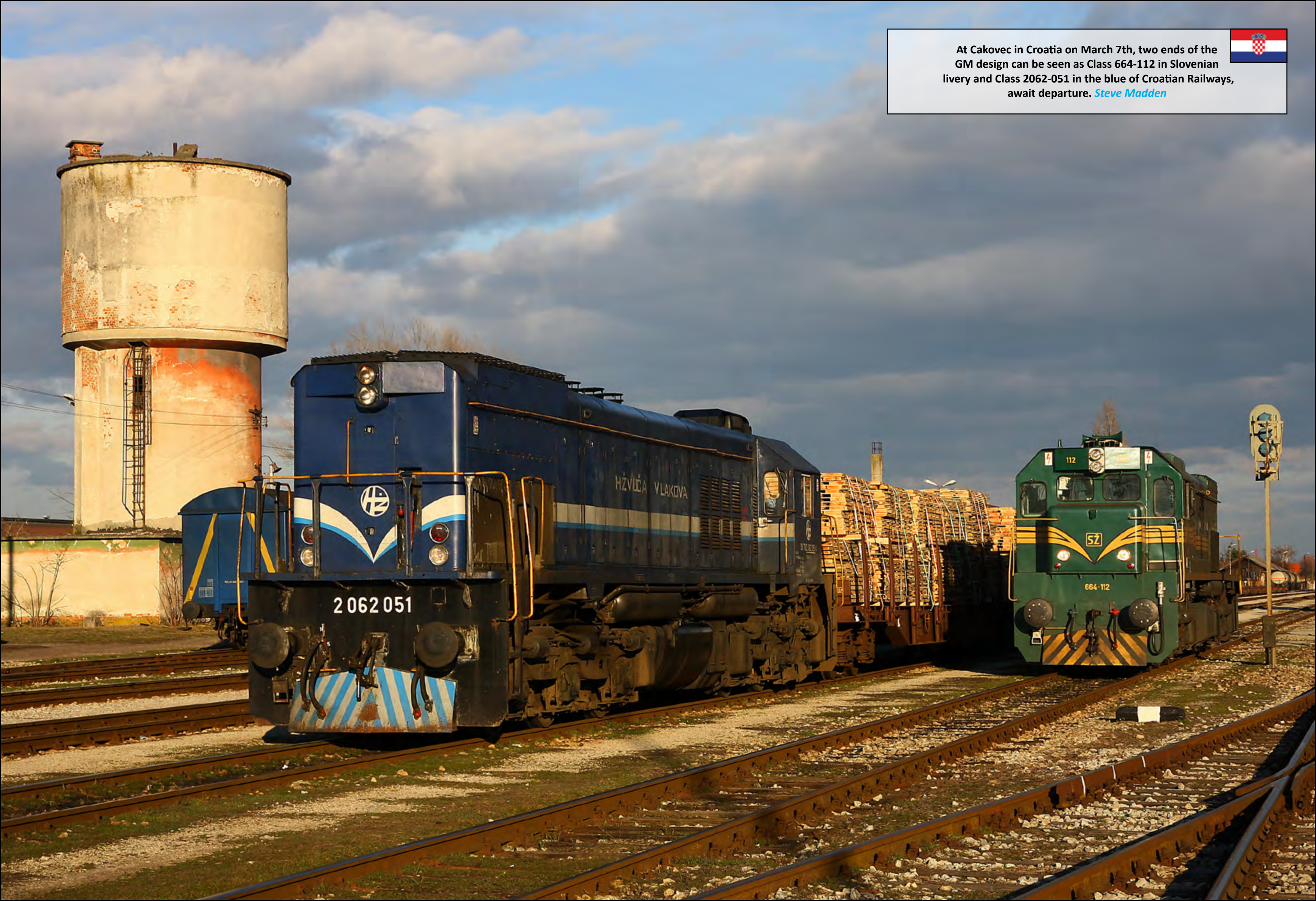
At Cakovec in Croatia on March 7th, two ends of the GM design can be seen as Class 664-112 in Slovenian livery and Class 2062-051 in the blue of Croatian Railways, await departure.