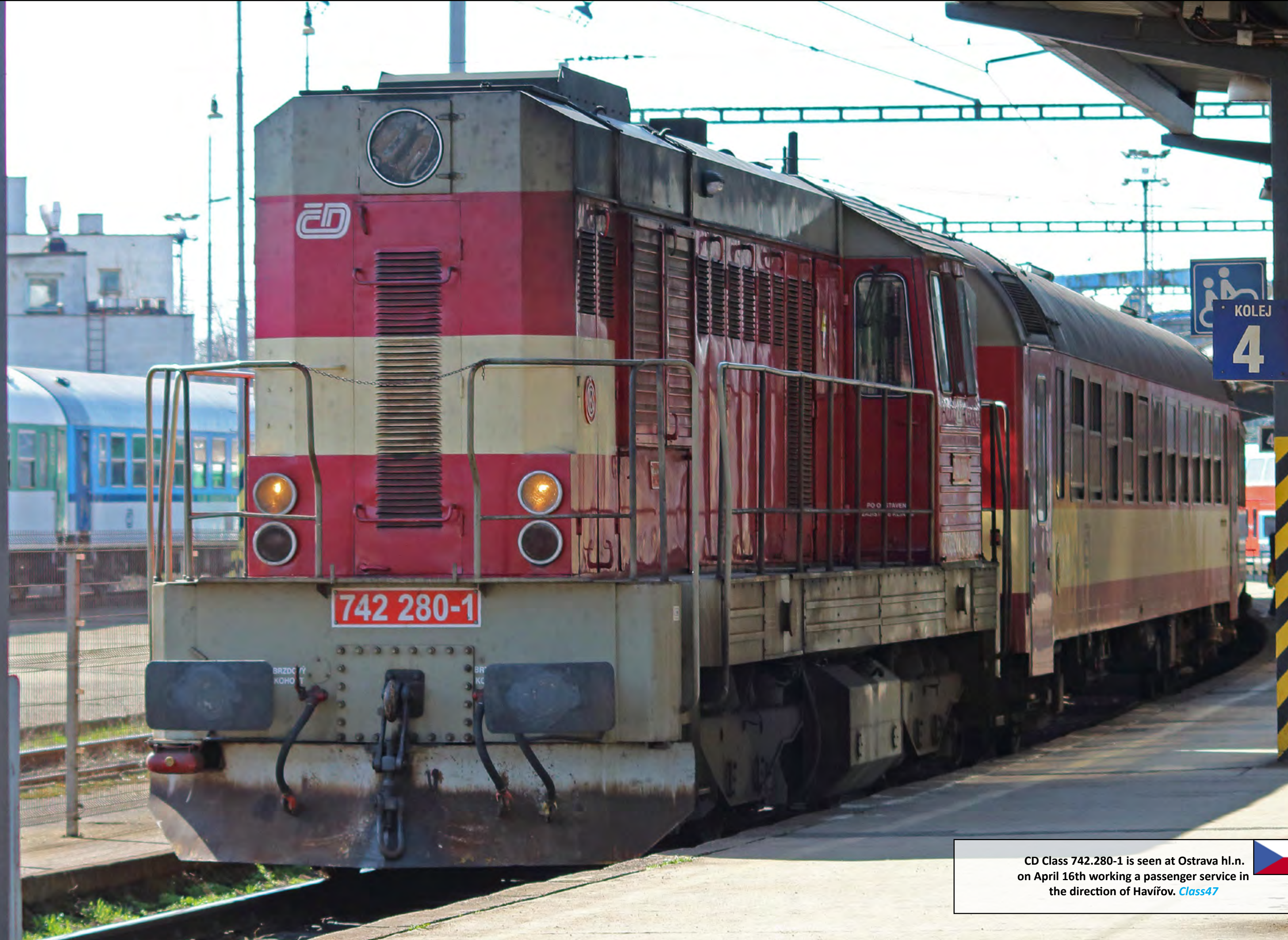
CD Class 742.280-1 is seen at Ostrava hl.n. on April 16th working a passenger service in the direction of Havířov. Class47