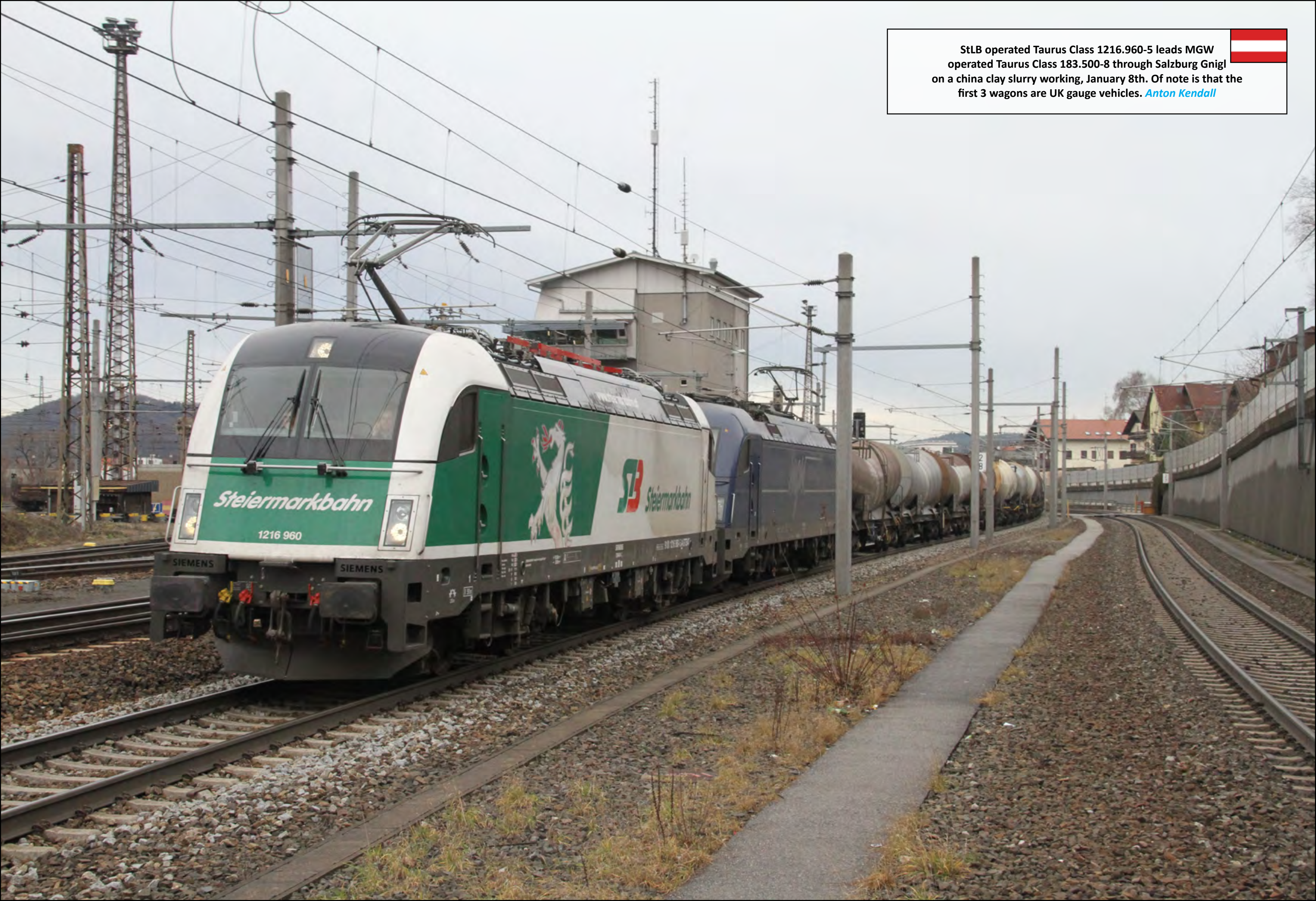
StLB operated Taurus Class 1216.960-5 leads MGW operated Taurus Class 183.500-8 through Salzburg Gnigl on a china clay slurry working, January 8th. Of note is that the first 3 wagons are UK gauge vehicles.