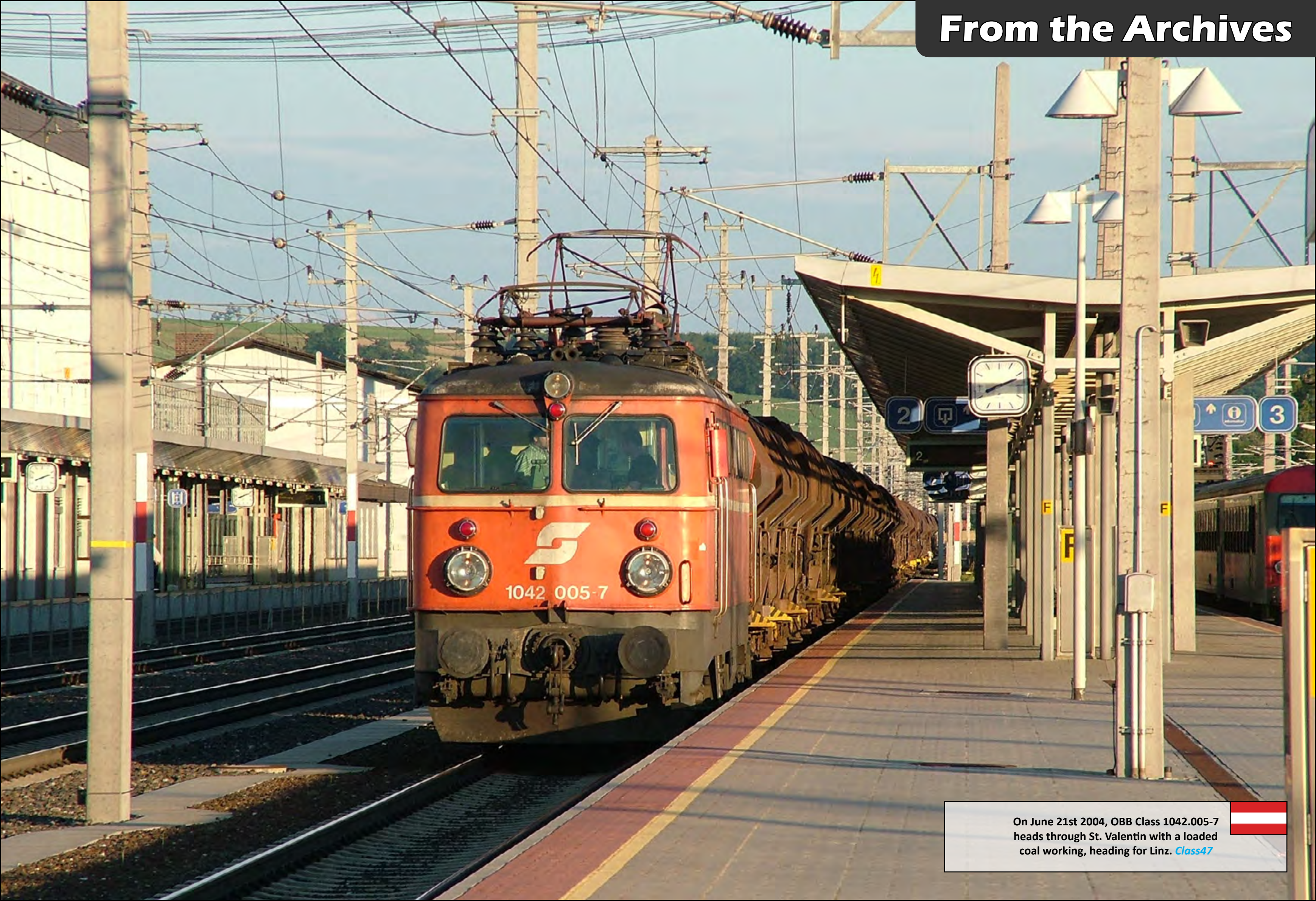
On June 21st 2004, ÖBB Class 1042.005-7 heads through St. Valentin with a loaded coal working, heading for Linz.