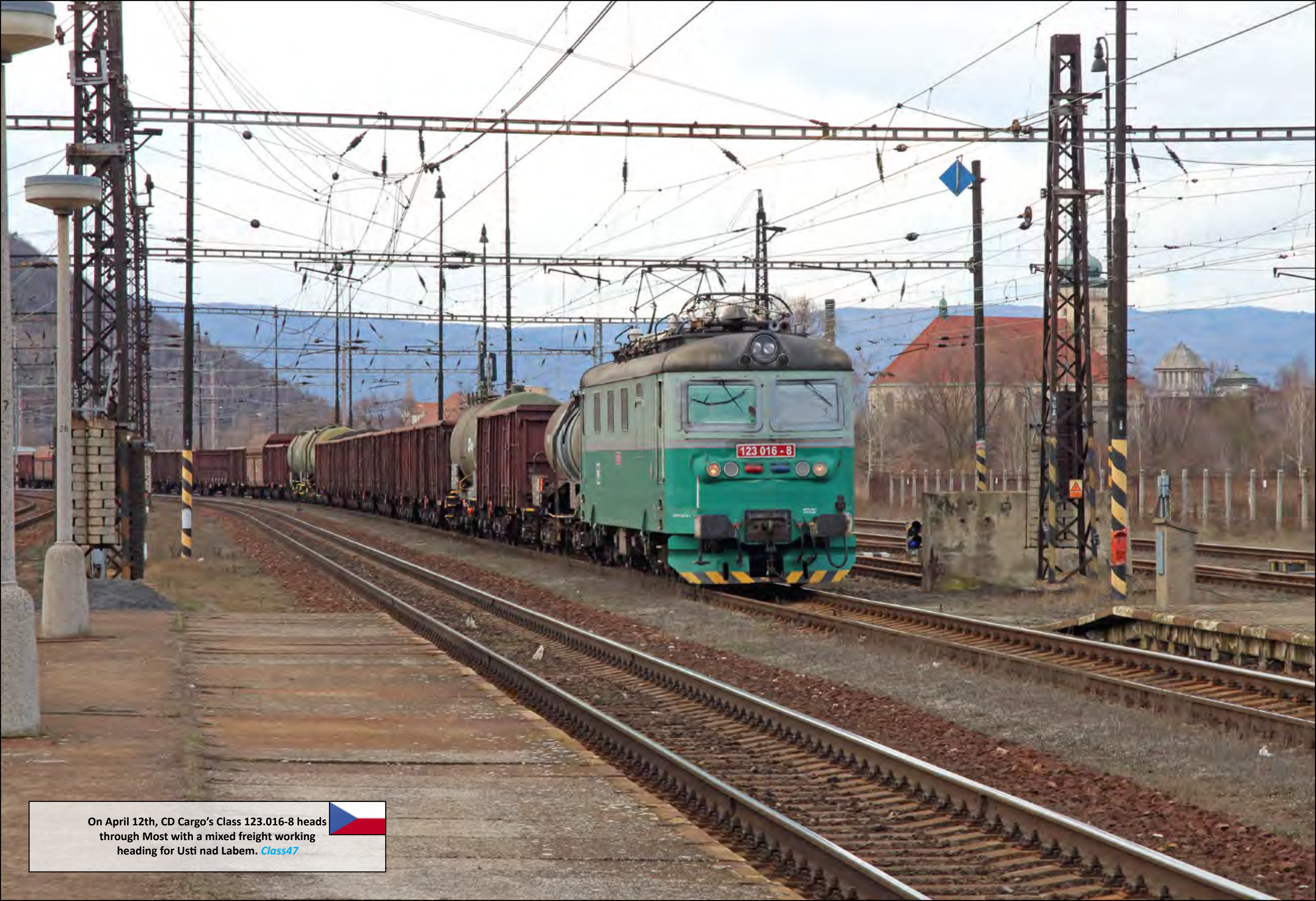
On April 12th, CD Cargo's Class 123.016-8 heads through Most with a mixed freight working heading for Usti nad Labem.