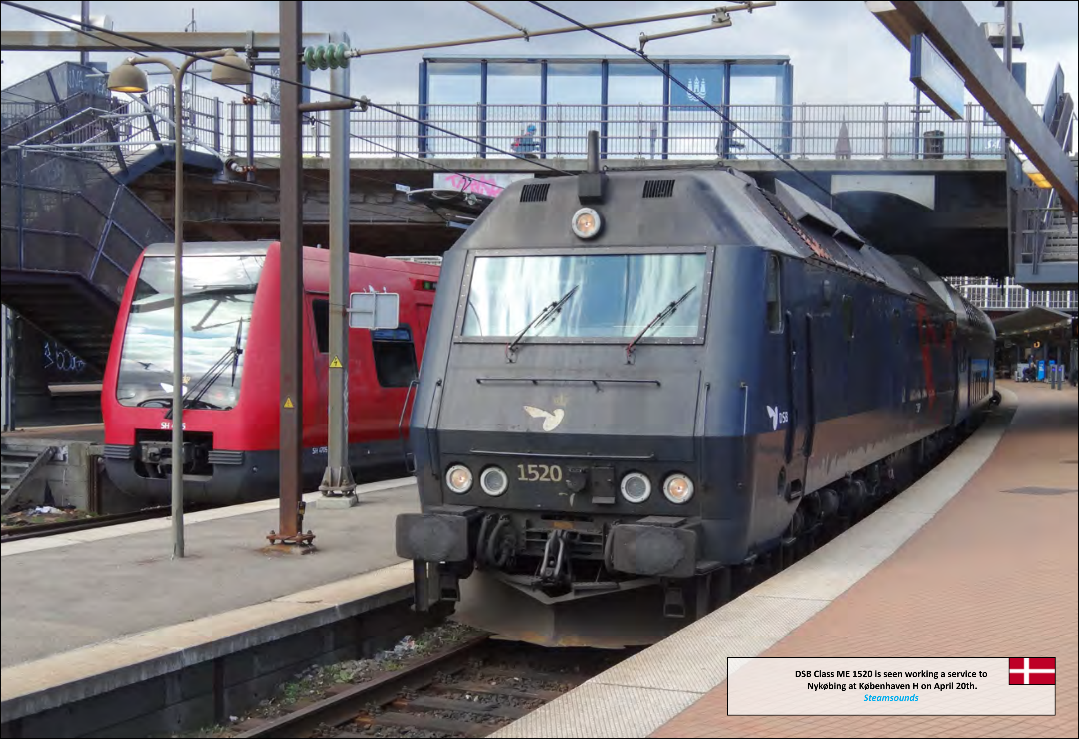
DSB Class ME 1520 is seen working a service to Nykøbing at København H on April 20th.