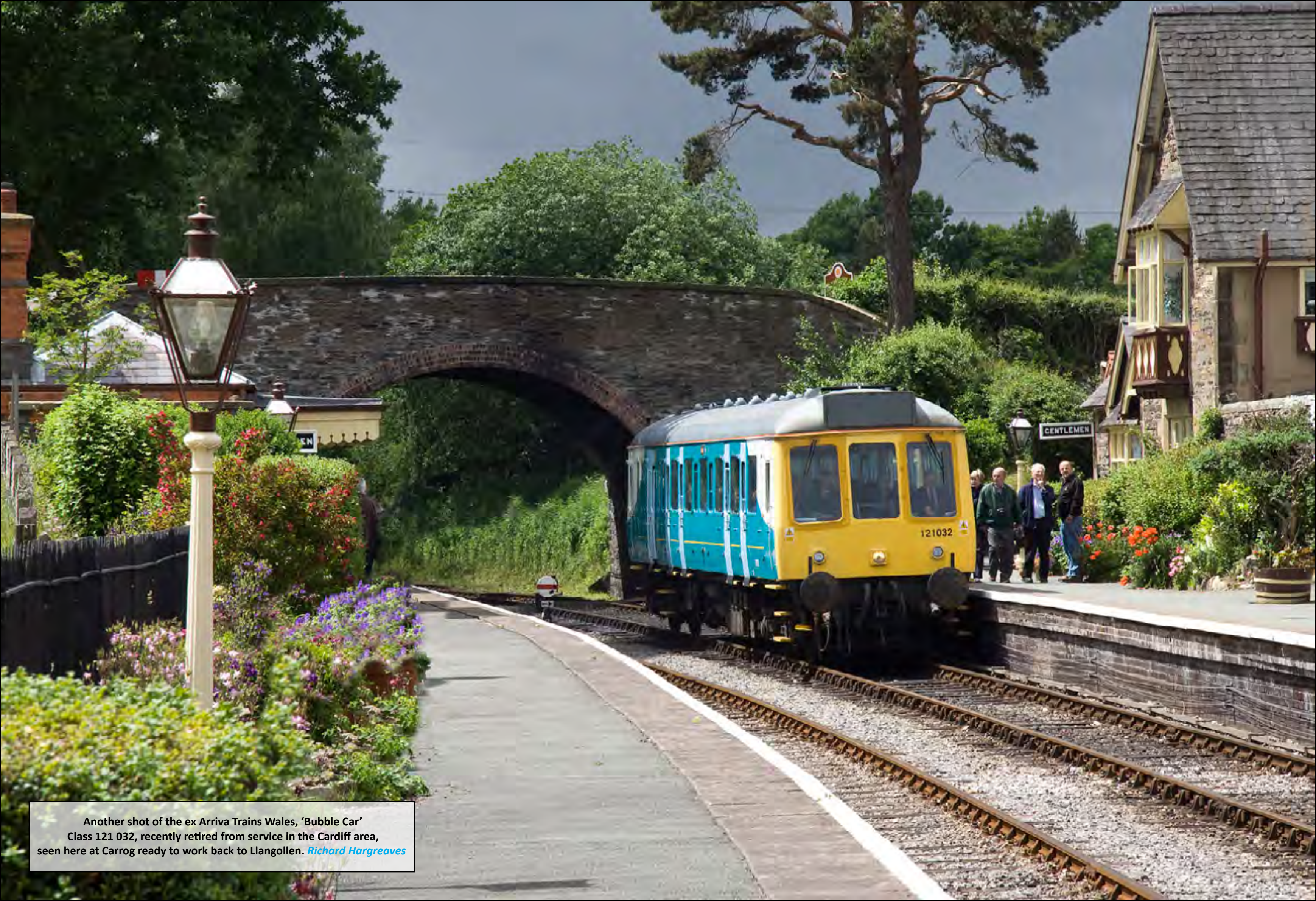
Another shot of the ex Arriva Trains Wales, 'Bubble Car' Class 121 032, recently retired from service in the Cardiff area, seen here at Carrog ready to work back to Llangollen.