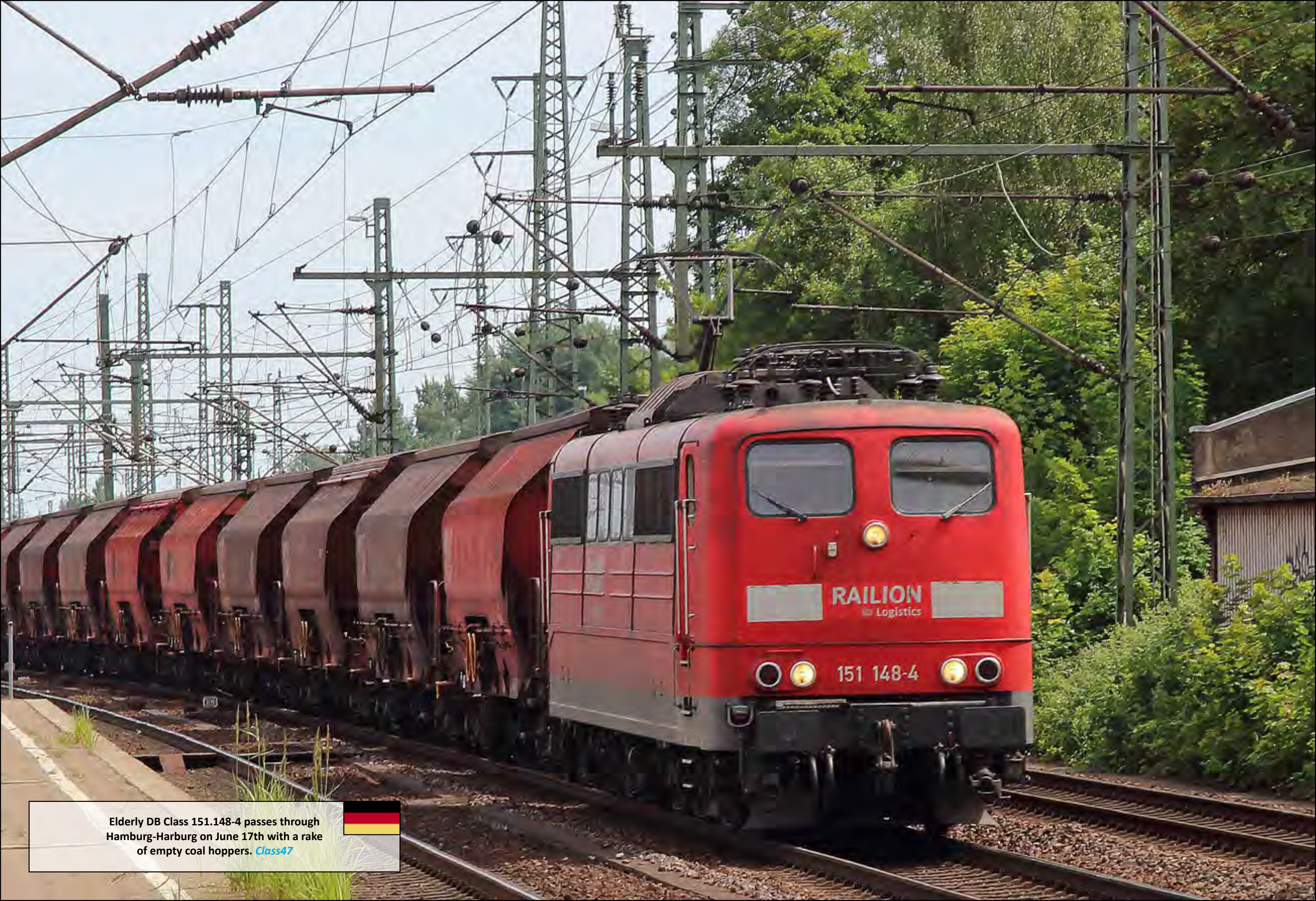
Elderly DB Class 151.148-4 passes through Hamburg-Harburg on June 17th with a rake of empty coal hoppers.