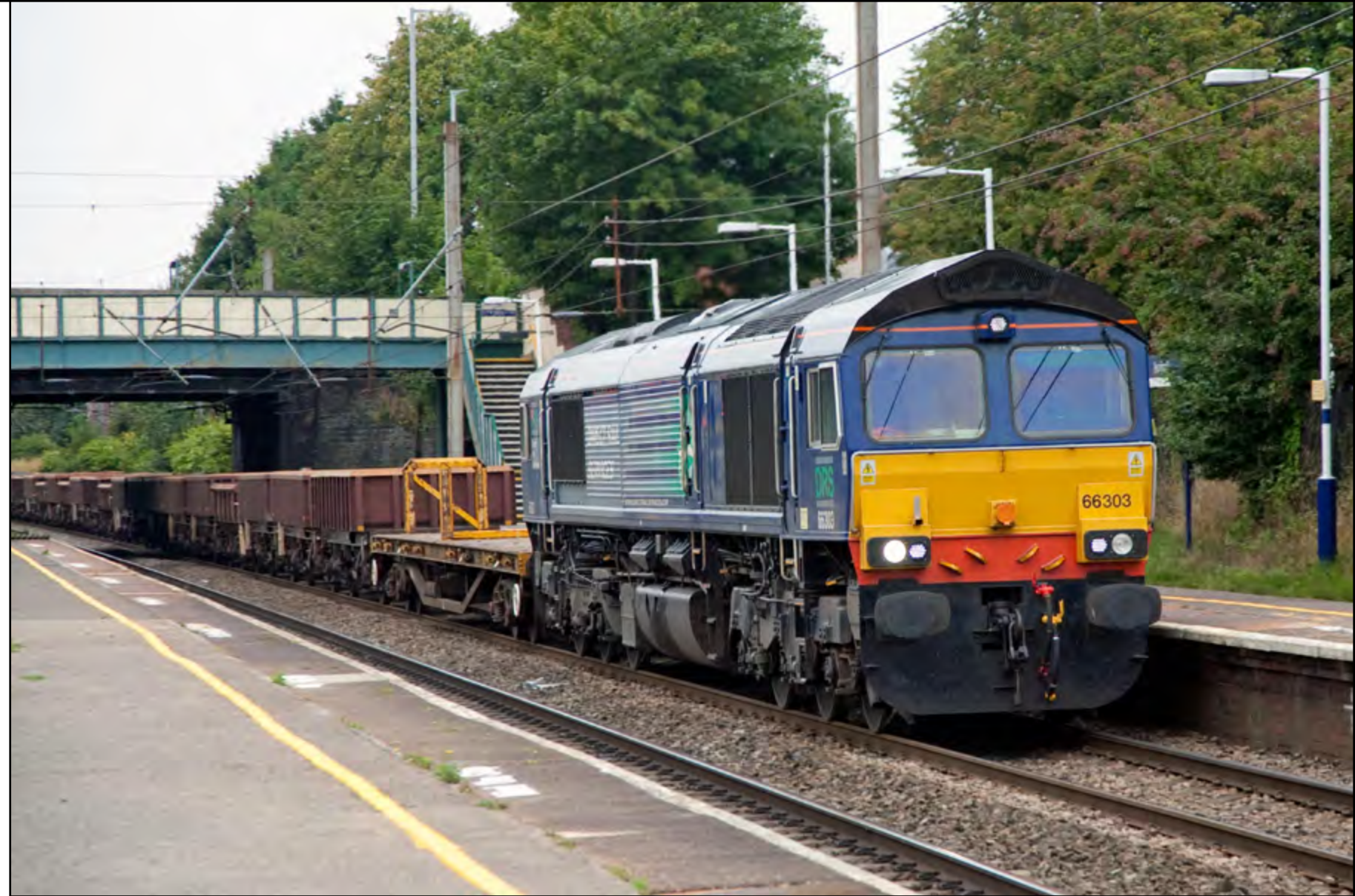
Top Right: Class 66 303 with the 6K05 engineers train from Carlisle New Yard to Crewe Basford Hall passes through Leyland station on September 12th. Alan Naylor