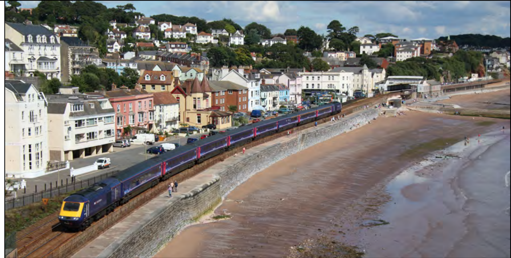
Above: A First Great Western HST heads through Dawlish on September 6th with a London Paddington - Penzance service.