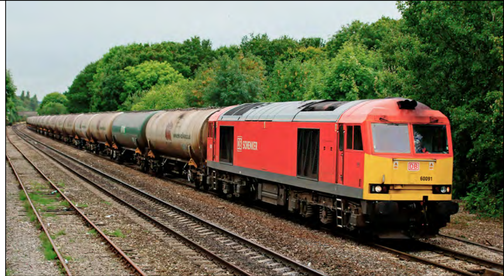
Above: Class 60 091 working the 6E41 Westerleigh - Lindsey heads through Cheltenham on September 26th. Lewis Mitchell