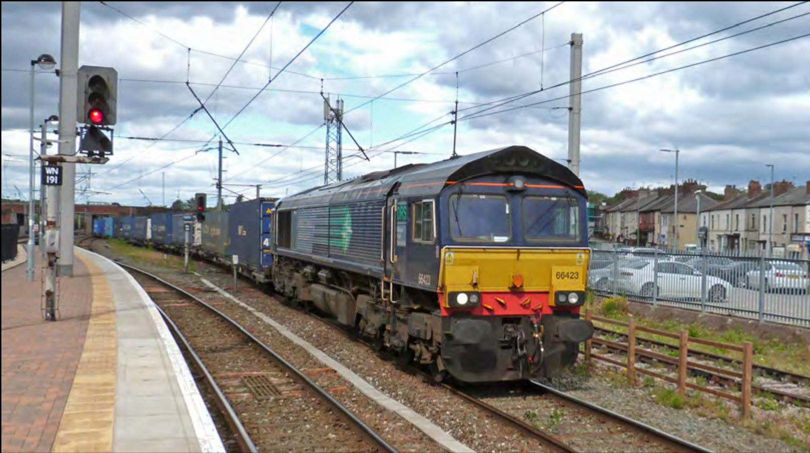
Above: On September 10th, Class 66 423 heads south through Warrington Bank Quay with the Malcolm Mossend Yard - Daventry intermodal.