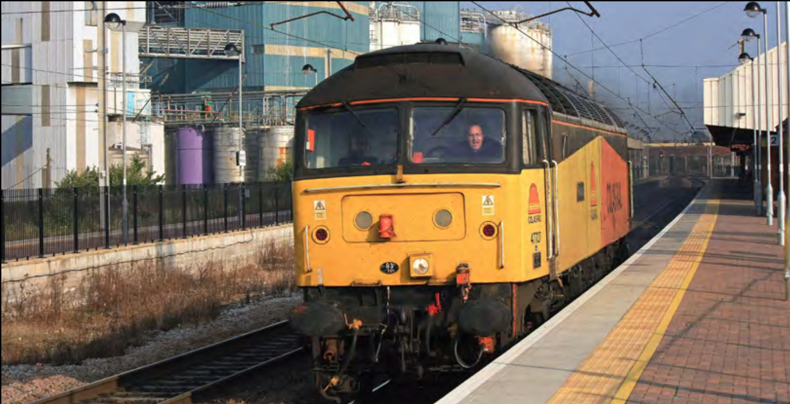
Above: Class 47 727 'Rebecca' is seen hammering through Warrington Bank Quay on a light engine move from Wigan Wallgate Carriage Sidings to Washwood Heath on September 28th.