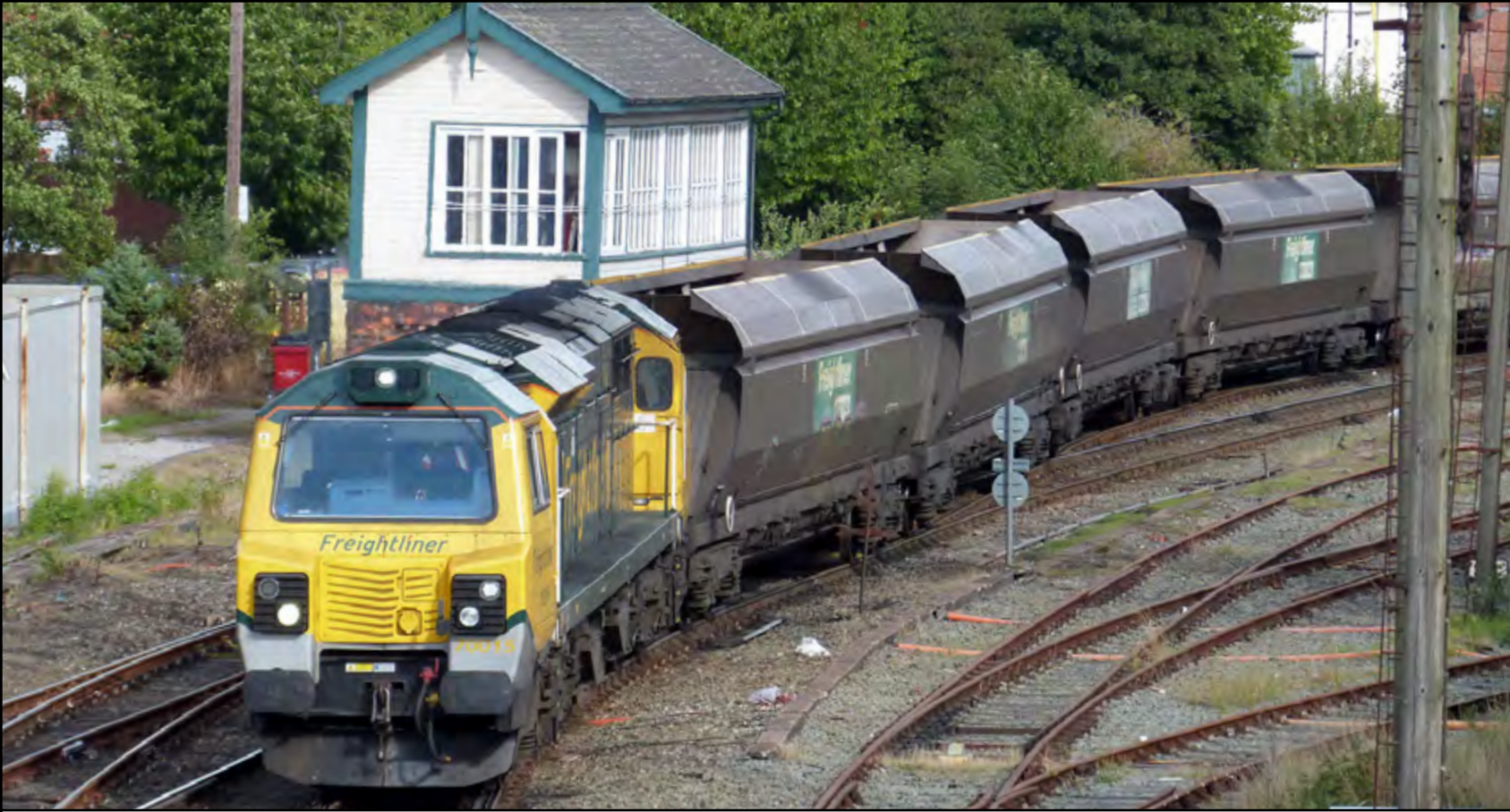
Above: On September 10th, Class 70 015 leaves Arpley Junction for Ellesmere Port with empty coal hoppers from Fiddlers Ferry power station. Michael Lynam