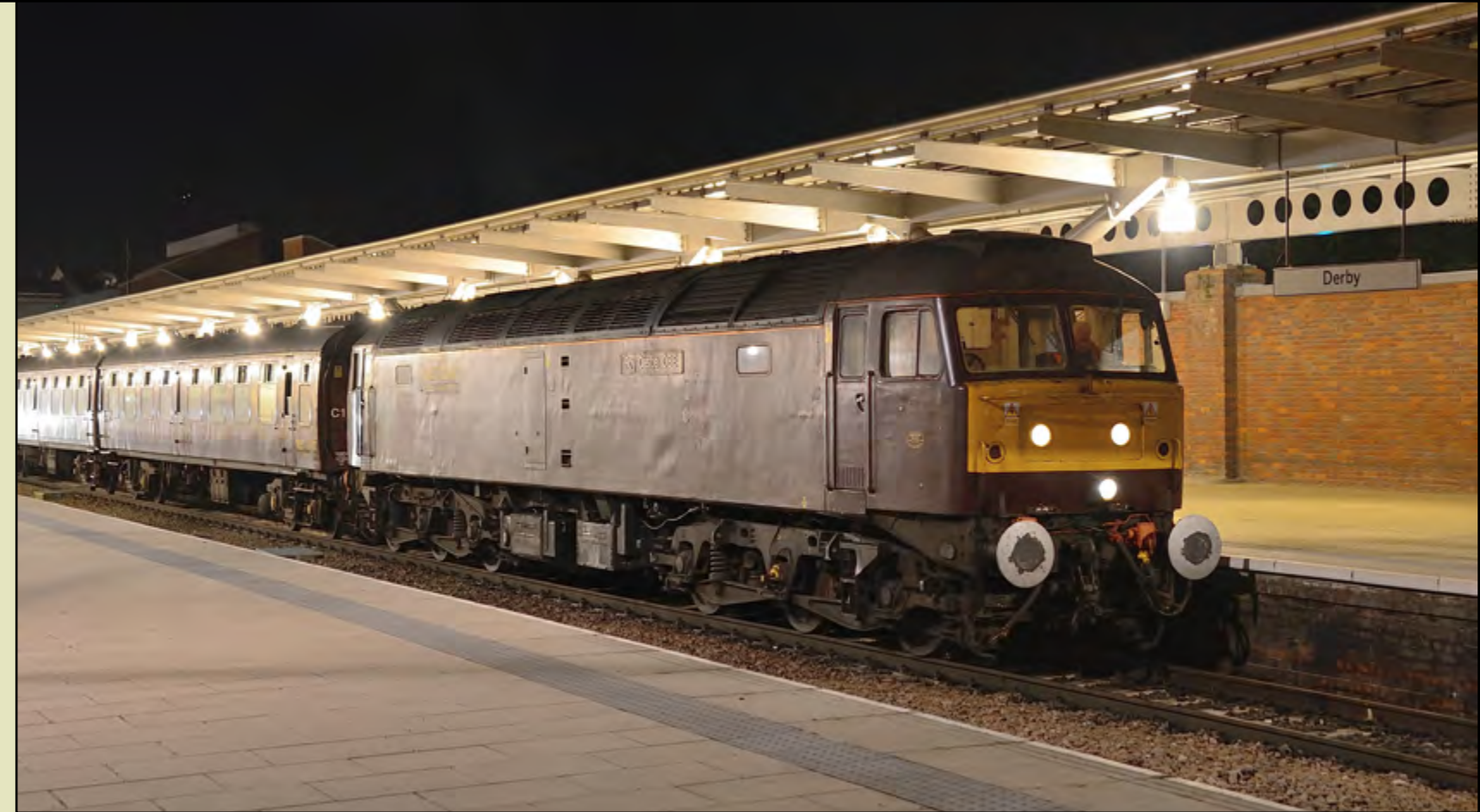
PMR Tours - Duchess of Sutherland 75th Anniversary

Above: Class 47 786 top'n'tailed with 47 826 are seen at Derby on September 7th with the return working of this tour from Perth to Sheffield via Crewe. The tour was diesel hauled from Sheffield to Crewe and return. Class47