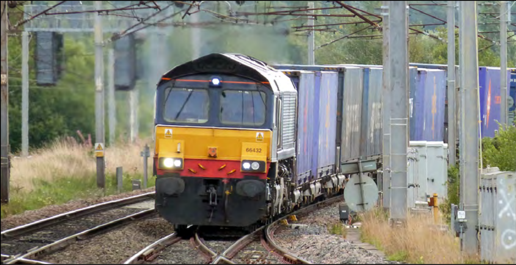
Above: Class 66 432 heads north through Warrington Bank Quay with the Malcolm Daventry - Coatbridge intermodal working on September 10th.