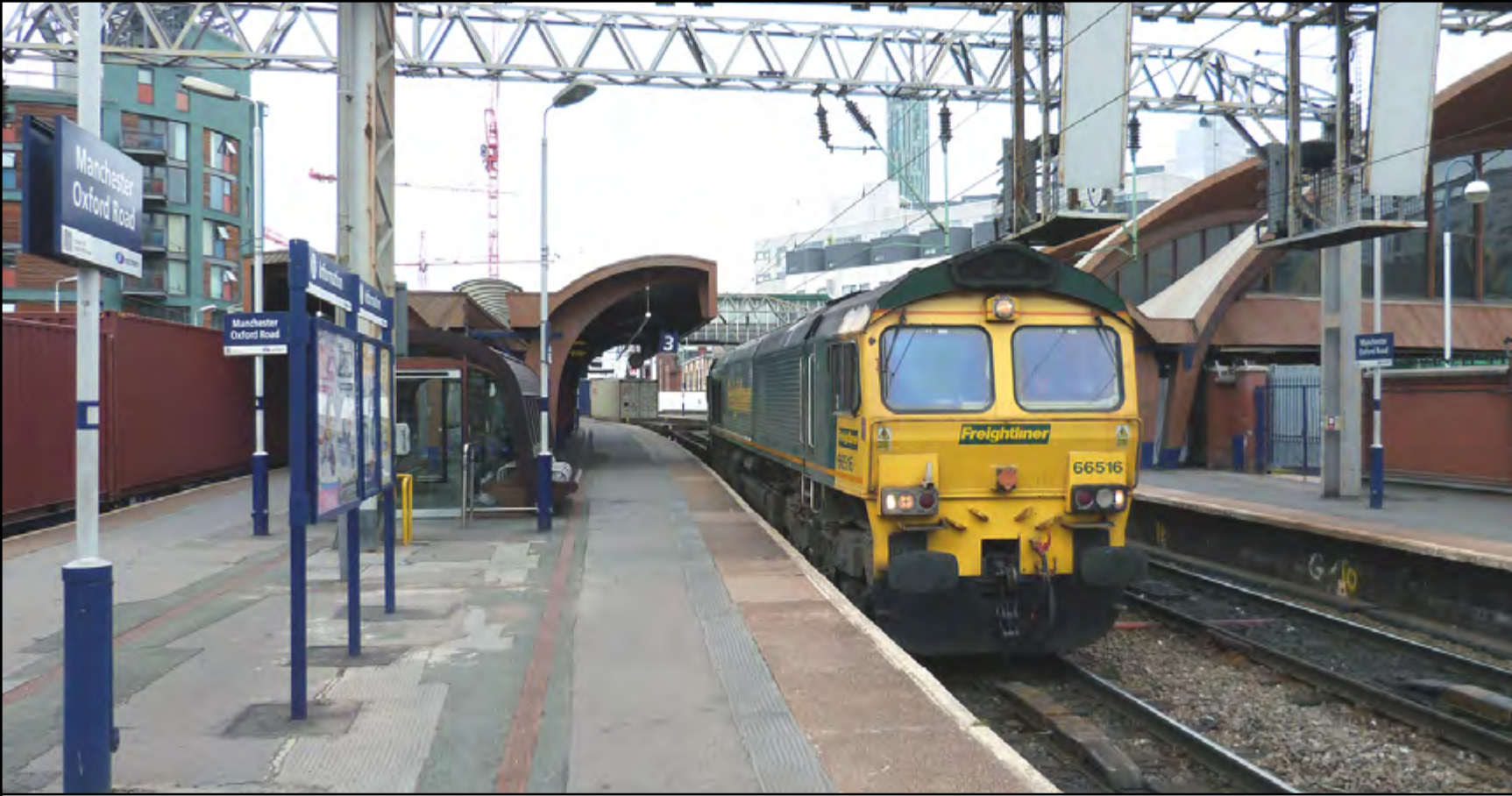
Above: Class 66 516 heads through Manchester Oxford Road on September 2nd with a Trafford Park FLT - Southampton MCT working. Michael Lynam