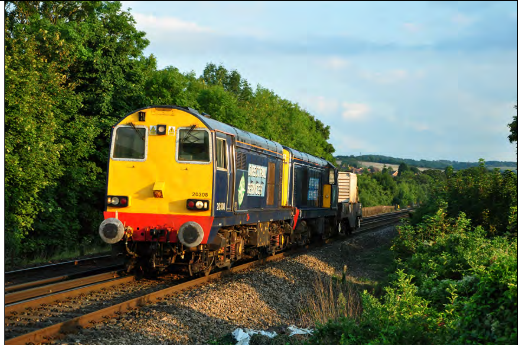
Top Right: On September 3rd, Class 20 308 and 20 303 power the 6M95 Dungeness - Willesden Brent passing Eynsford Viaduct in some wonderful summers evening sunshine. Daniel Stanbridge