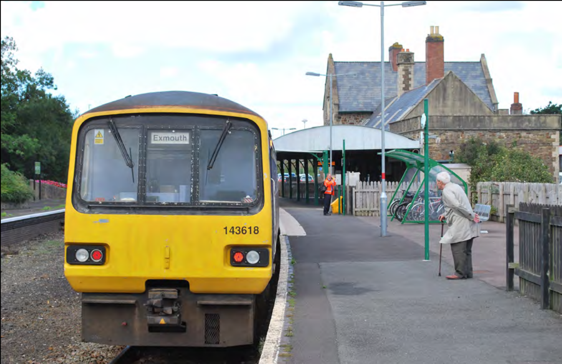
Top Left: Barnstaple is an example of a station much reduced in both size and importance; it was formerly named Barnstaple Junction with lines radiating to Ilfracombe, Torrington, Appledore, Exeter, Taunton and Barnstaple Town (with a connection for the Lynton & Barnstaple Railway). Fortunately, not all of the buildings have been demolished to be replaced by a bus shelter and some semblance of its former glories remain including some SR green running-in boards and totems visible in this image taken on September 18th showing First Great Western's Class 143 618 about to work the 13:43 departure to Exmouth. The photographer wonders if the elderly gentleman visible was an intending passenger or a life-long railway enthusiast remembering his boyhood days stood on a station platform such as this one watching in awe the workings of a beautiful steam engine. Stuart Warr