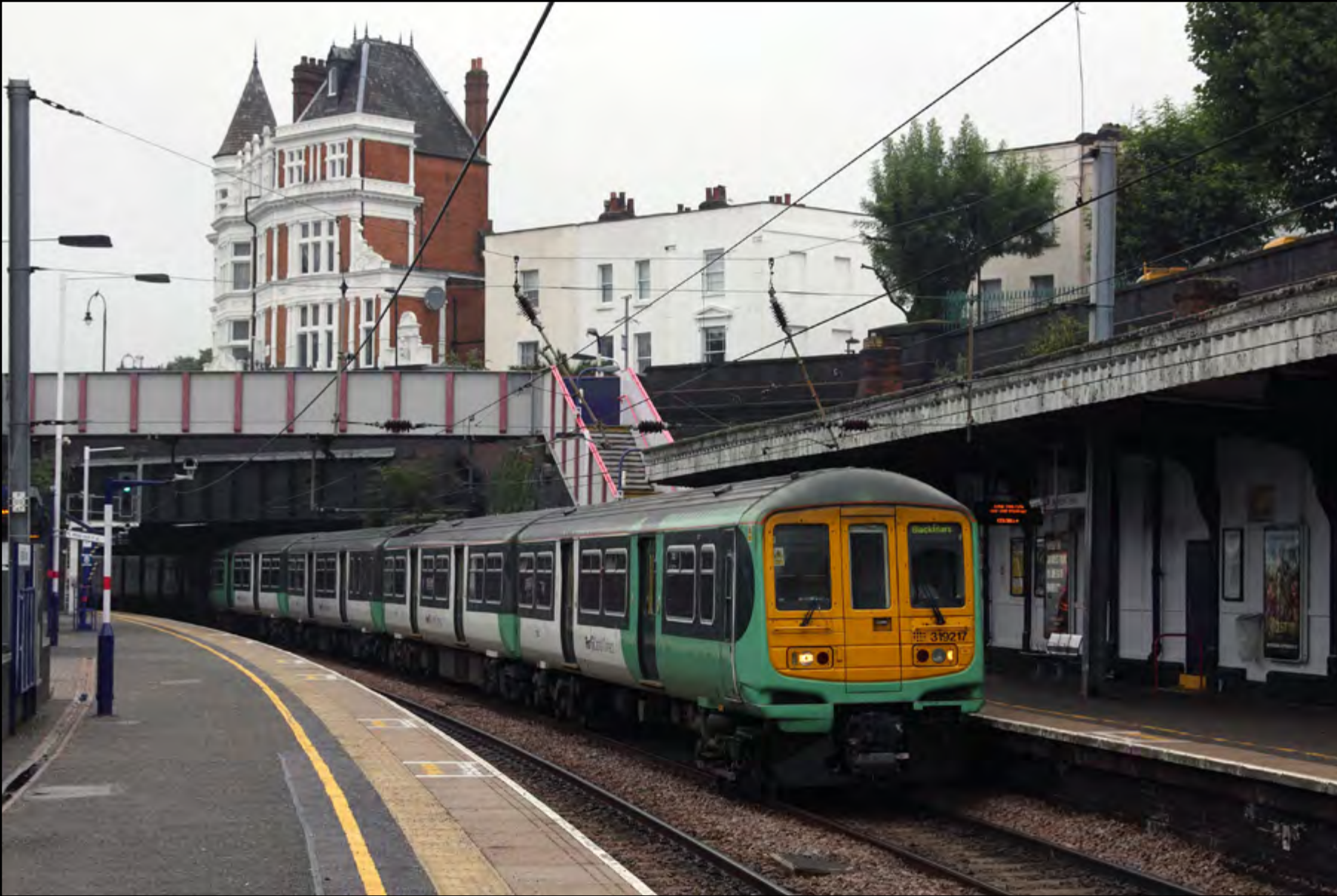
Top Left: First Capital Connect's Class 319 217 arrives into Kentish Town on September 14th with a service to Blackfriars. Paul Godding