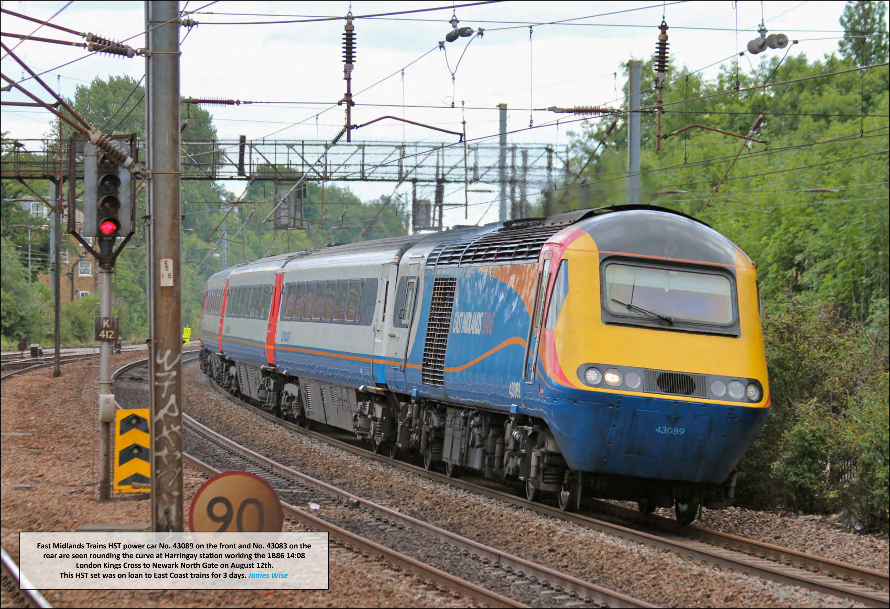
East Midlands Trains HST power car No. 43089 on the front and No. 43083 on the rear are seen rounding the curve at Harringay station working the 1B86 14:08 London Kings Cross to Newark North Gate on August 12th. This HST set was on loan to East Coast trains for 3 days. James Wise