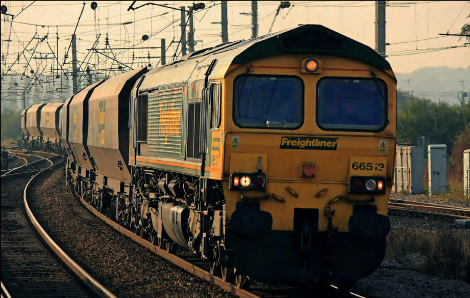
Top Left: Class 66 513 leads a Ferrybridge to Carlisle coal empties working away from Warrington Arpley yard and onto the West Coast main line, September 28th. Derek Elston