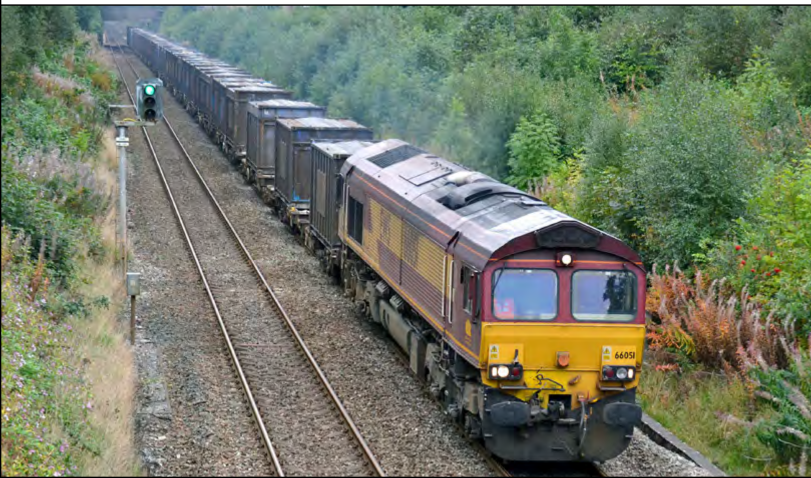
Below: Class 66 051 hauling the 6Z76 empty gypsum containers from New Biggin to Warrington Arpley passes through Cherry Tree area of Blackburn on September 23rd. Dave Felton