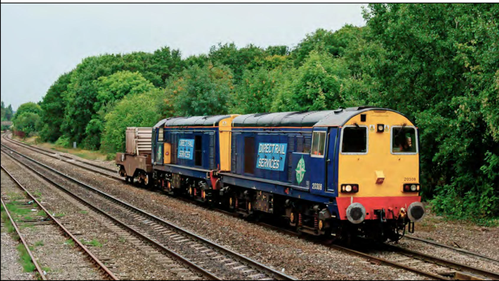
Below: On September 26th, Class 20 308 and 20 302 heads through Cheltenham working the 6M63 Bridgwater - Crewe flask. Lewis Mitchell