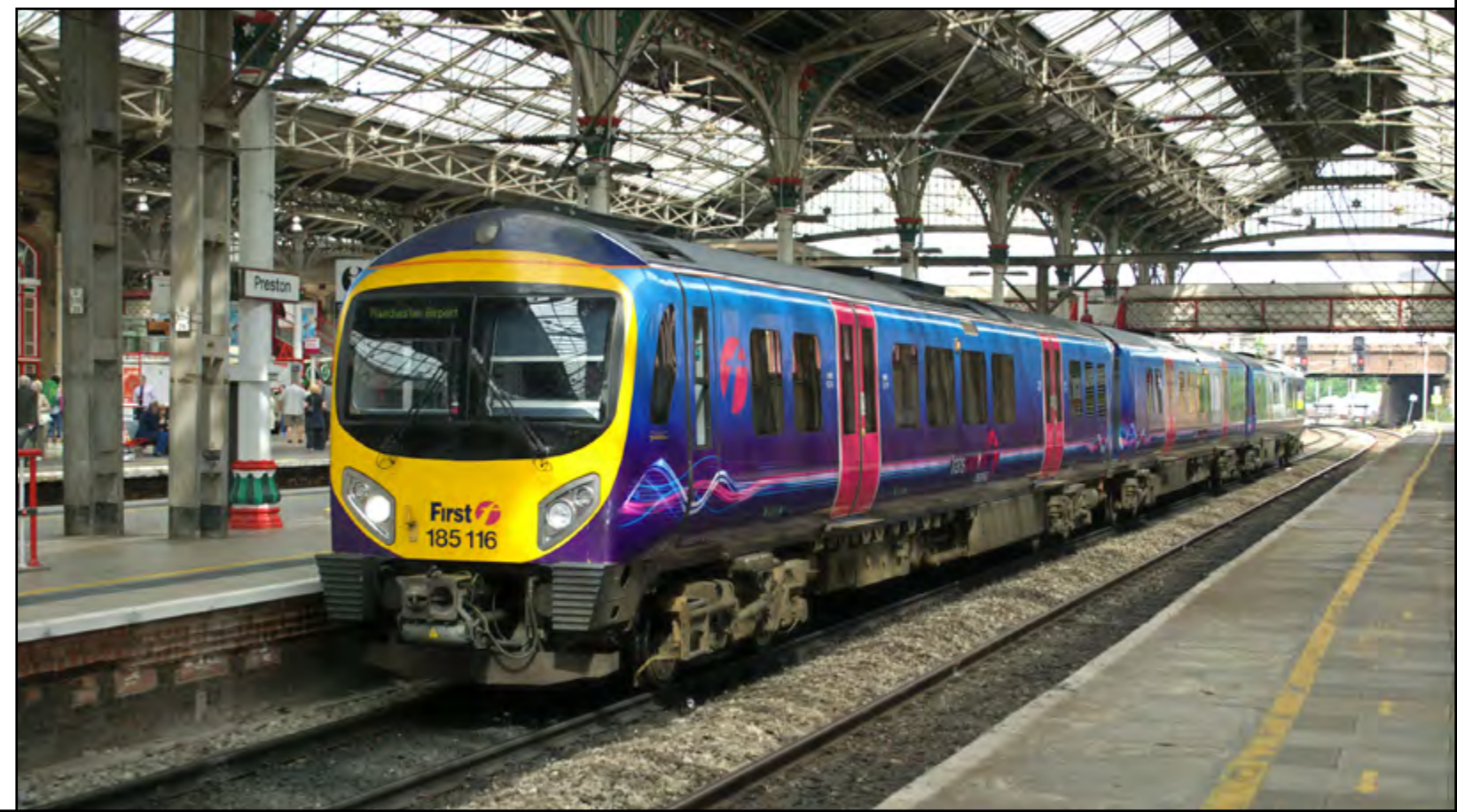
Below: First TransPennine Express Class 185 116 is seen waiting to depart from Preston station with the 1U62 10:49 service from Windermere to Manchester Airport on September 4th. Dave Felton