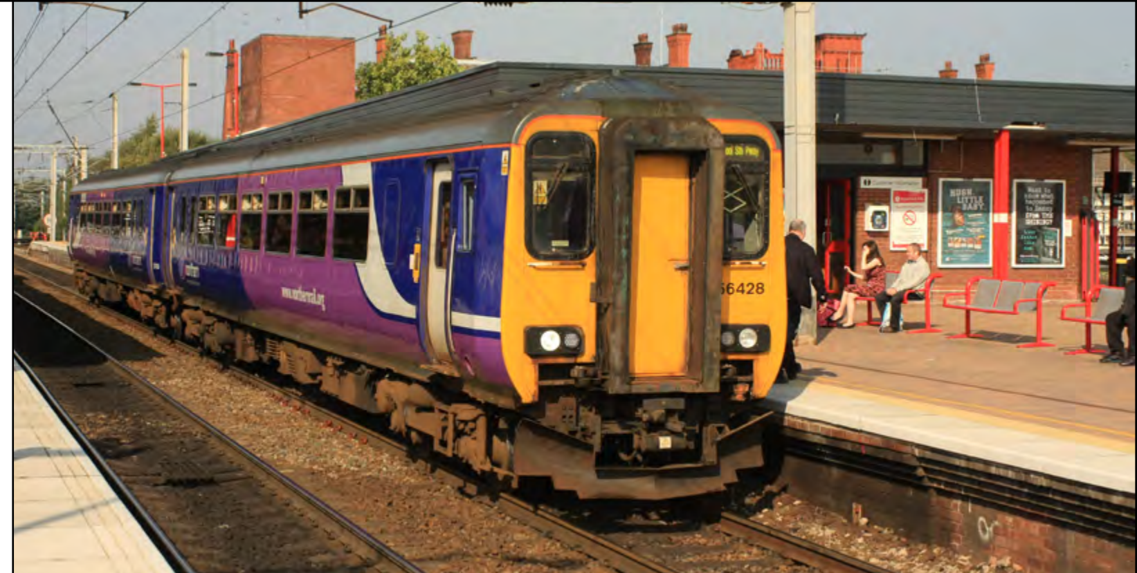
Above: Northern's Class 156 428 calls at Wigan with a service for Liverpool South Parkway on September 28th.