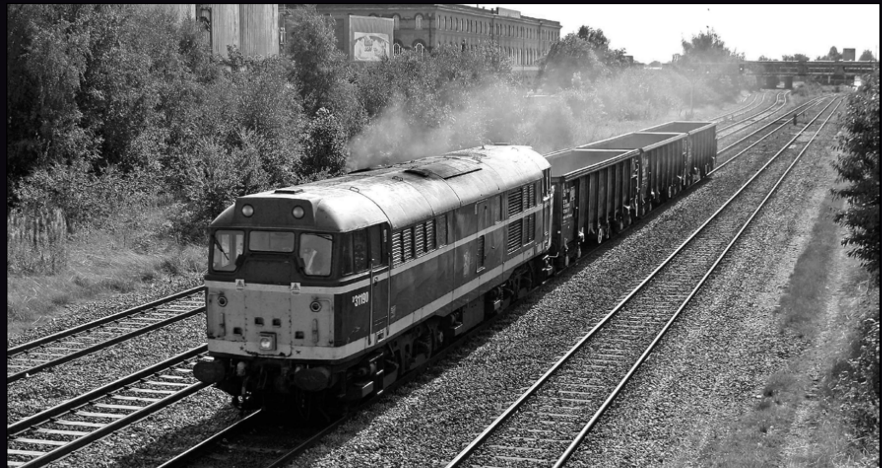
DCR's Class 31 190 is seen at the head of 6Z31 Eastleigh - Derby Chaddesden sidings with 3 refurbished wagons. Stuart Hillis