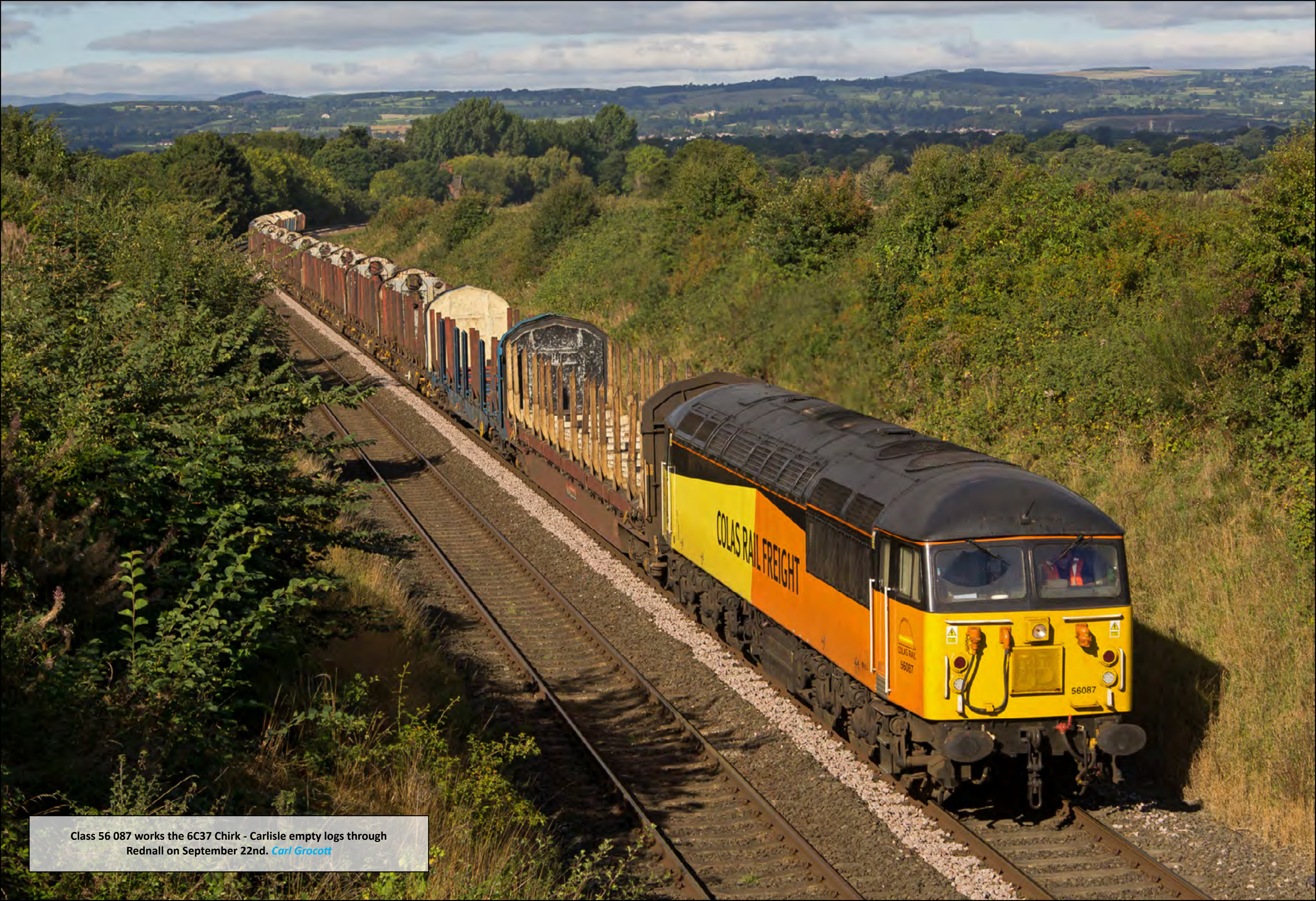
Class 56 087 works the 6C37 Chirk - Carlisle empty logs through Rednall on September 22nd. Carl Grocott