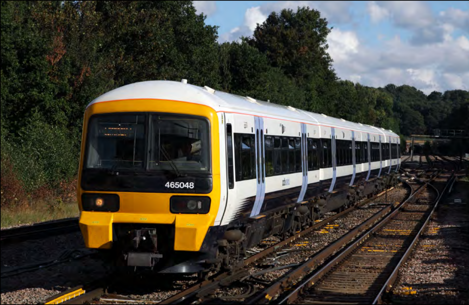
Top Left: Southeastern's Class 465 048 is seen arriving into Grove Park on September 7th.