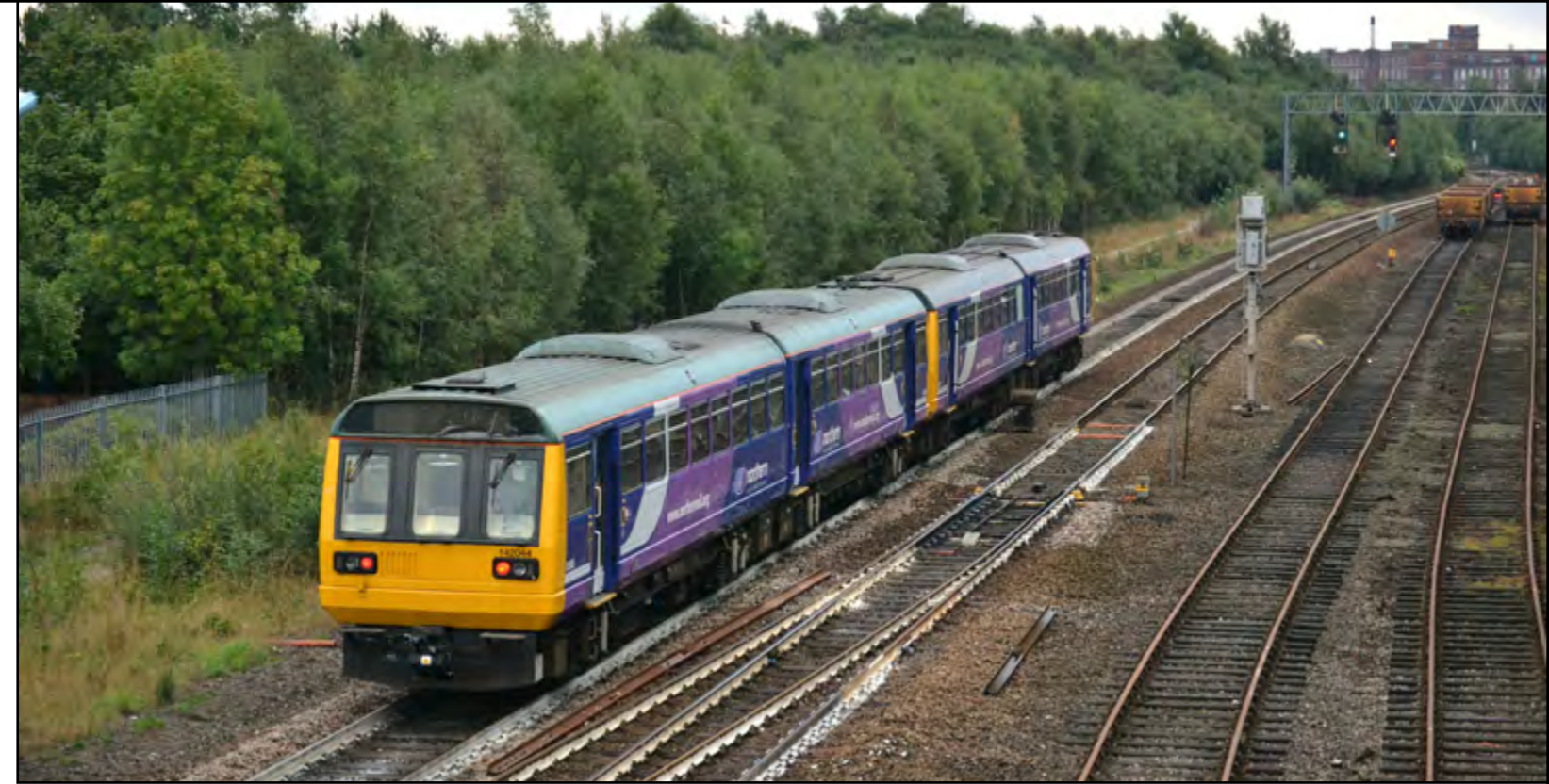
Above: Northern Rail's Class 142 044 and 142 061 heads south from Bolton with the 2A00 06:23 service from Southport to Manchester Airport on September 7th. Dave Felton