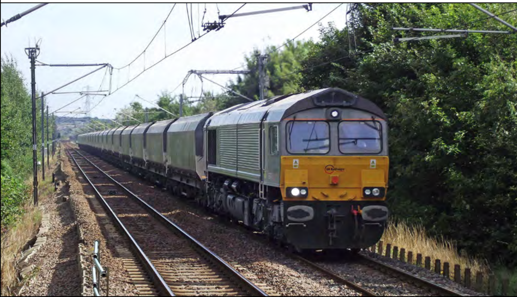
Below: Class 66 747 approaches Fellgate with a loaded Biomass working on September 8th. Alex Thorkildsen