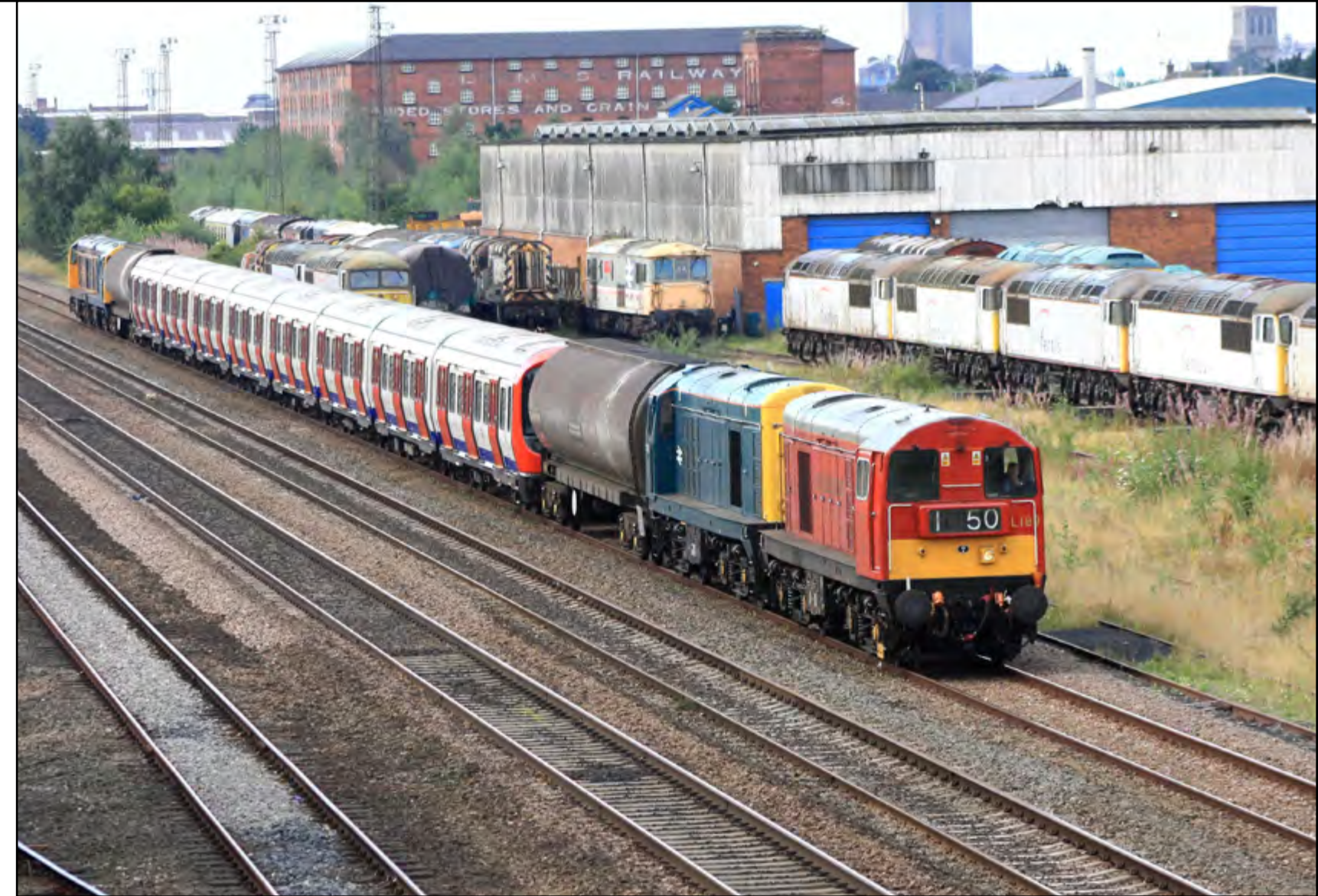
Top Right: On September 10th, the 7X10 Amersham - Derby Litchurch Lane passes Nemesis Rail's depot at Burton on Trent with Class 20 189 and 20 142, hauling 'S' stock sets Nos. 45 and 46 for rectification and 20 107 and 20 901 on the rear. Stuart Hillis