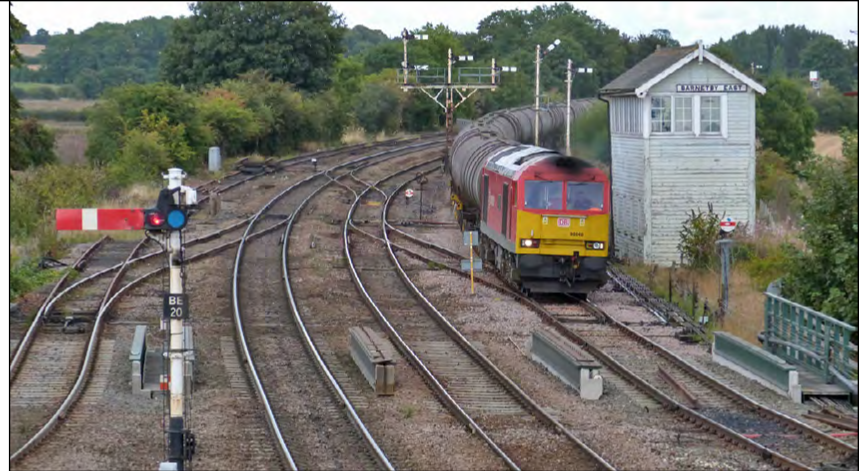
Above: On September 14th, Class 60 040 is seen heading through Barnetby with the Lindsey oil refinery - Didcot loaded fuel tanks. Michael Lynam