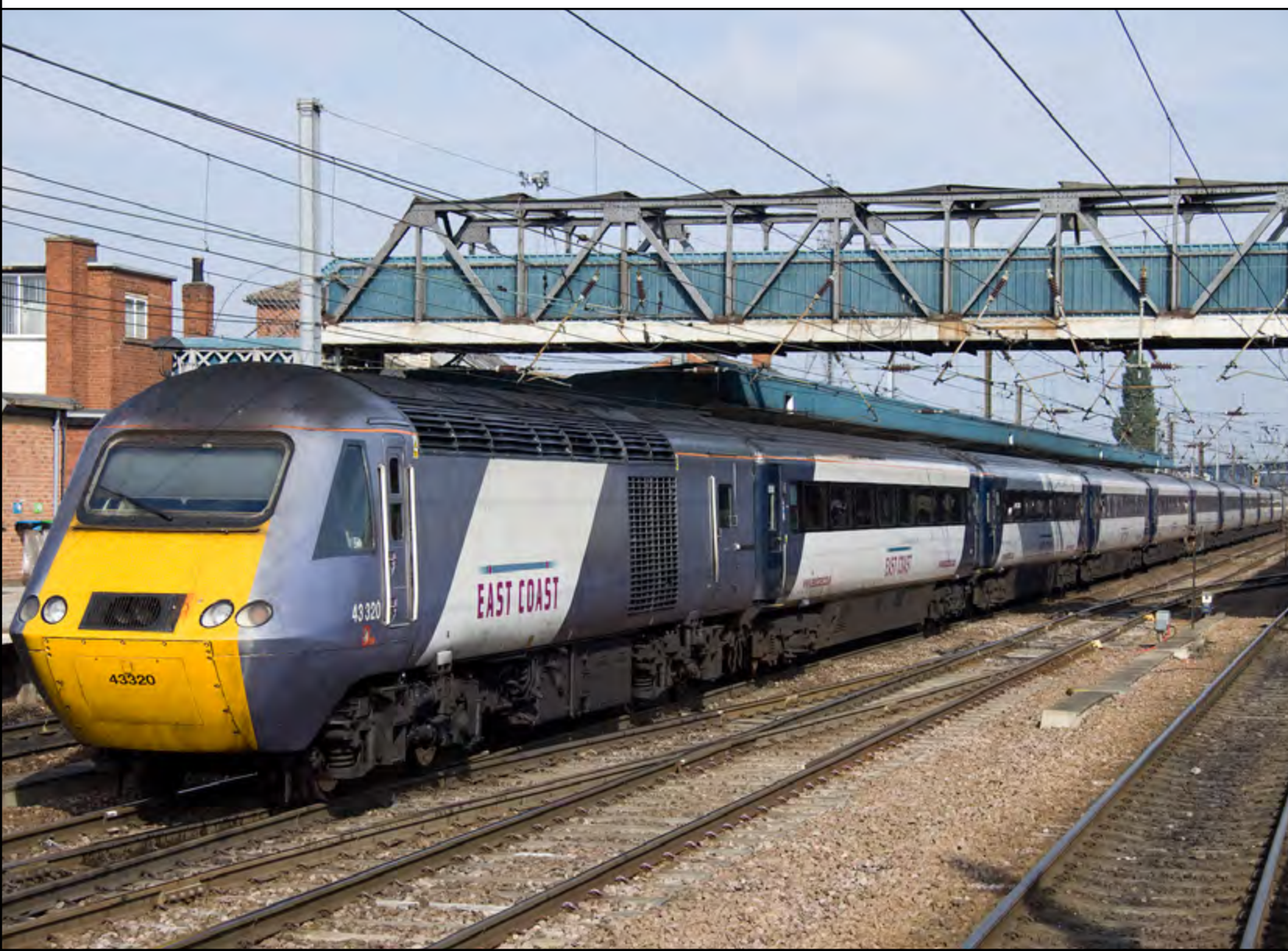
Bottom Left: Still carrying the remnants of its National Express livery, East Coast's HST power car No. 43320 is seen on the rear of an Edinburgh bound working through Doncaster on September 28th.