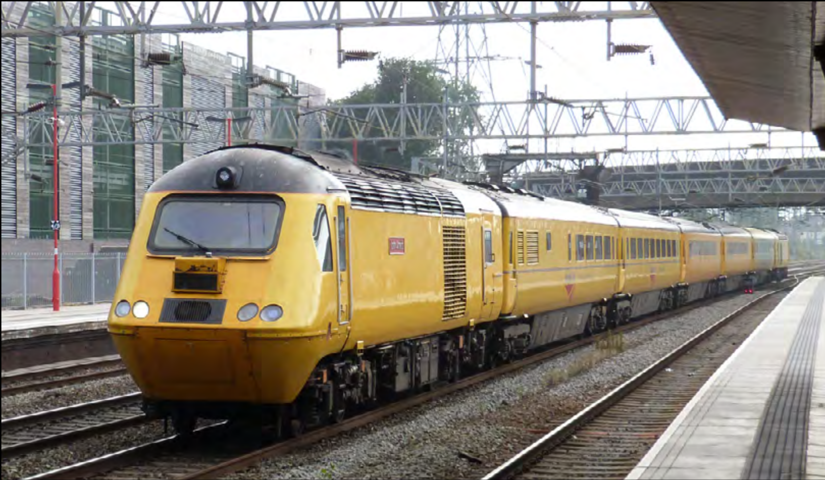
Above: The New Measurement Train passes through Stafford on September 24th on a run from Derby to Glasgow with power car No. 43014 'John Arnitt' leading. Michael Lynam