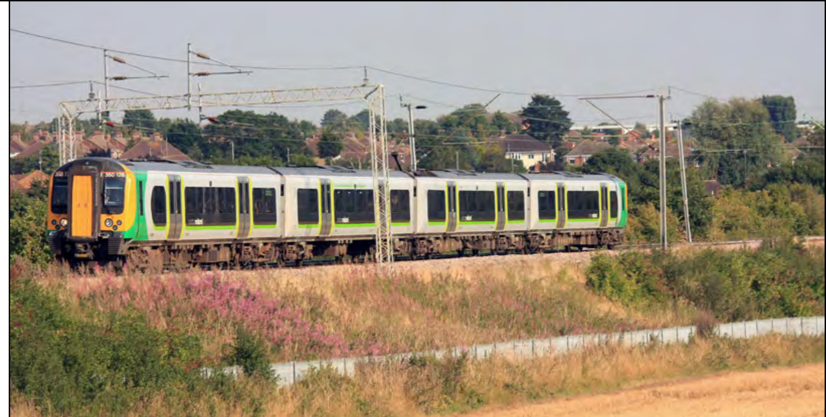
Above: London Midland's Class 350 126 passes Kingsthorpe with the 15:13 London Euston to Birmingham New Street service on September 4th. Derek Elston