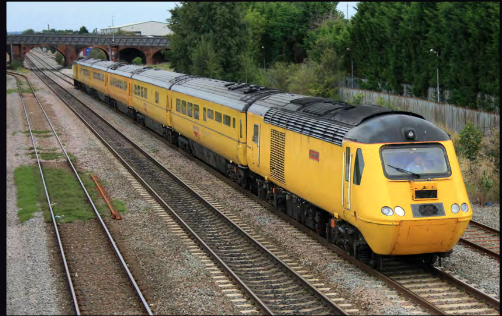
Network Rail's New Measurement Train with power cars Nos. 43062 and 43014 pass through Burton on Trent working a Derby RTC - London Euston - Derby RTC round trip on September 3rd.