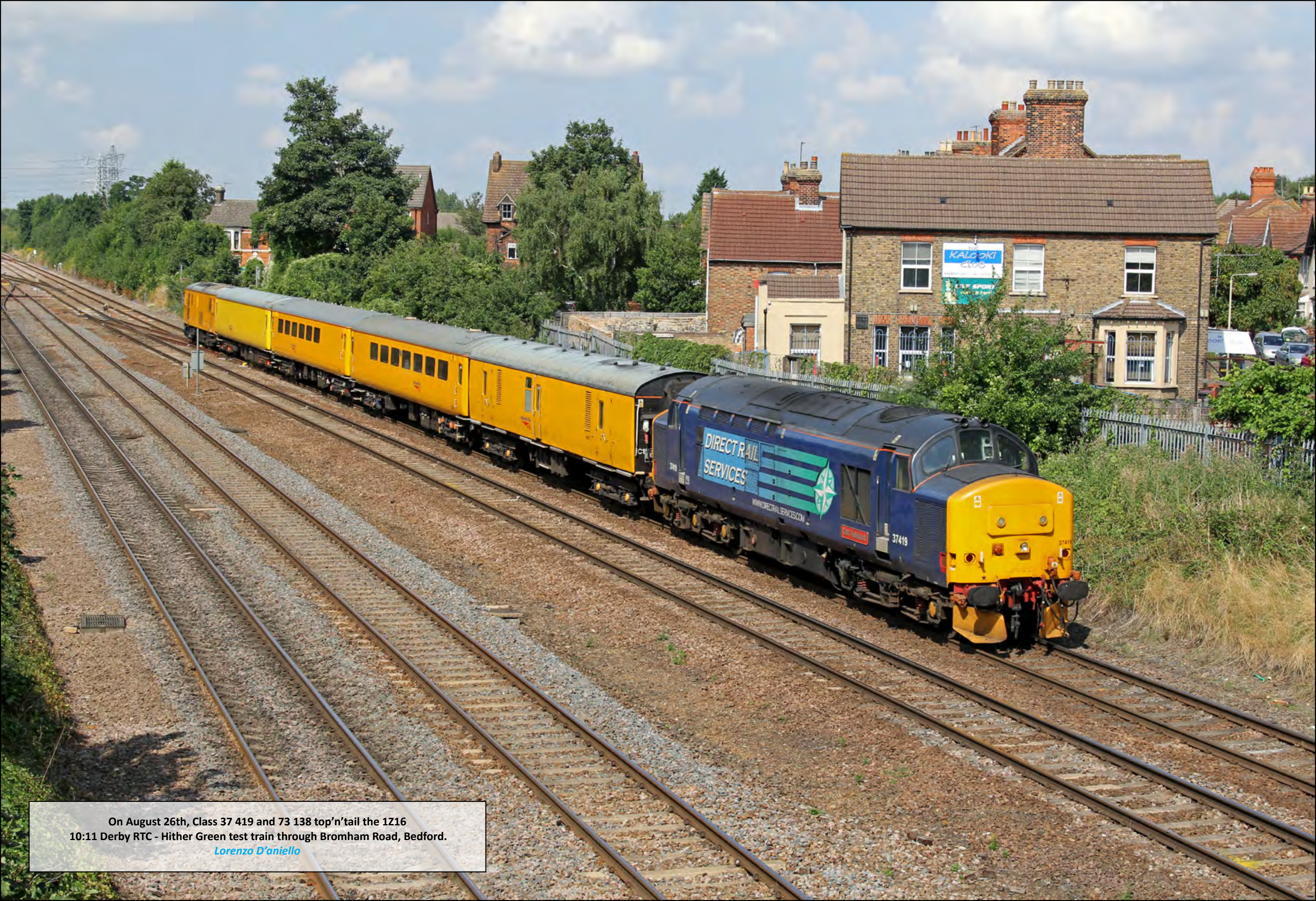
On August 26th, Class 37 419 and 73 138 top'n'tail the 1Z16 10:11 Derby RTC - Hither Green test train through Bromham Road, Bedford.