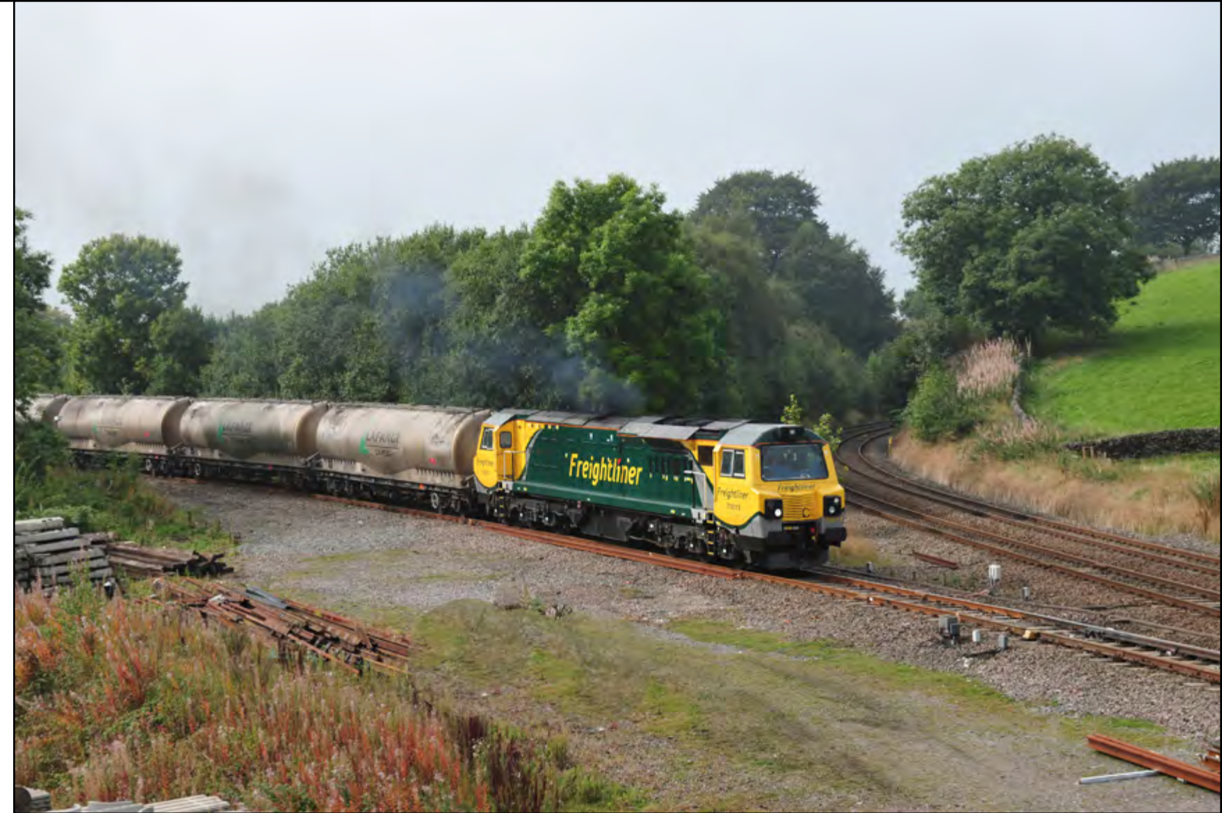
Top Right: Class 70 013 grows its way off Chinley Viaduct after a red light stop of 15 mins, with the 6L89 Tunstead to West Thurrock on September 25th. David Hollowood