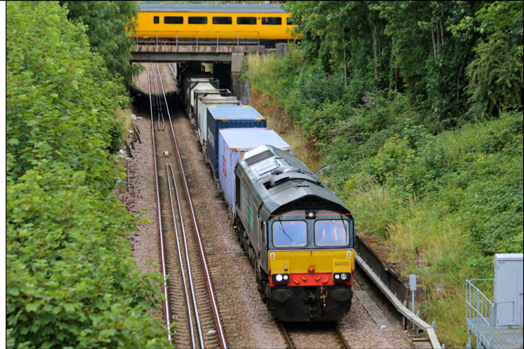
Top Right: Class 66 423 passes under the east coast mainline at Harringay Park Junction with the 4M71 11:29 Purfleet to Daventry Intermodal service on August 12th.