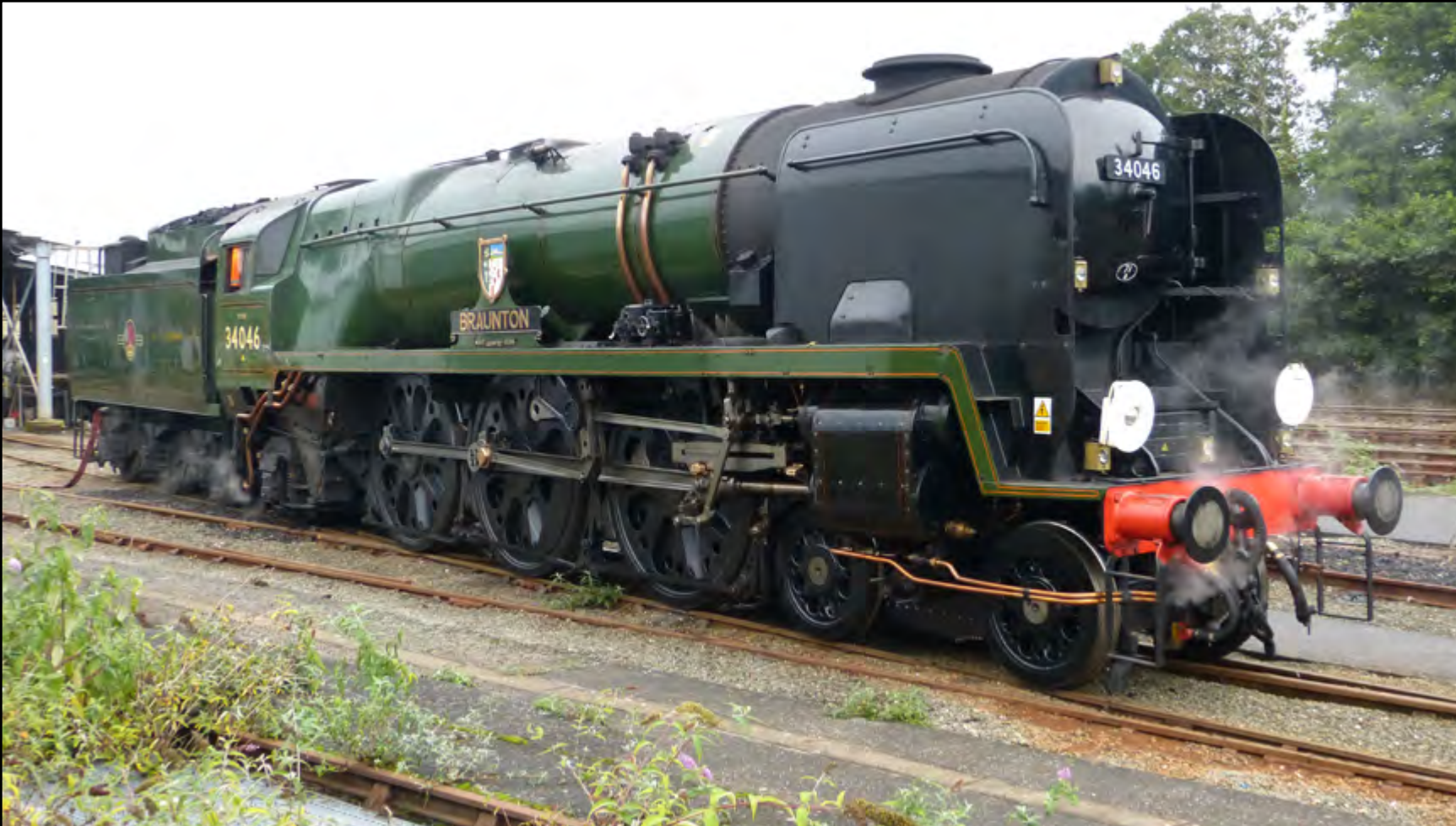
ECS and light engine moves

Above: No. 34046 'Braunton' stands on St. Blazey shed on September 29th.