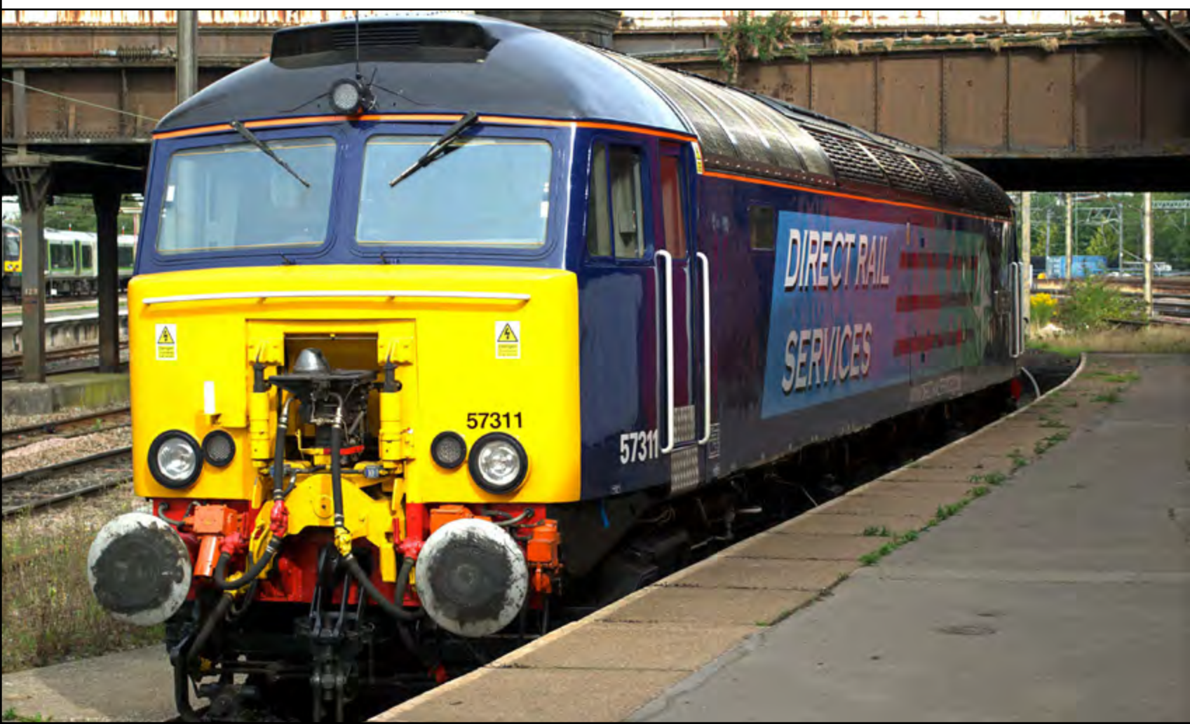
Below: Class 57 311 'Thunderbird' is seen stabled at the north end of Preston station for West Coast thunderbird duties on September 4th. Dave Felton