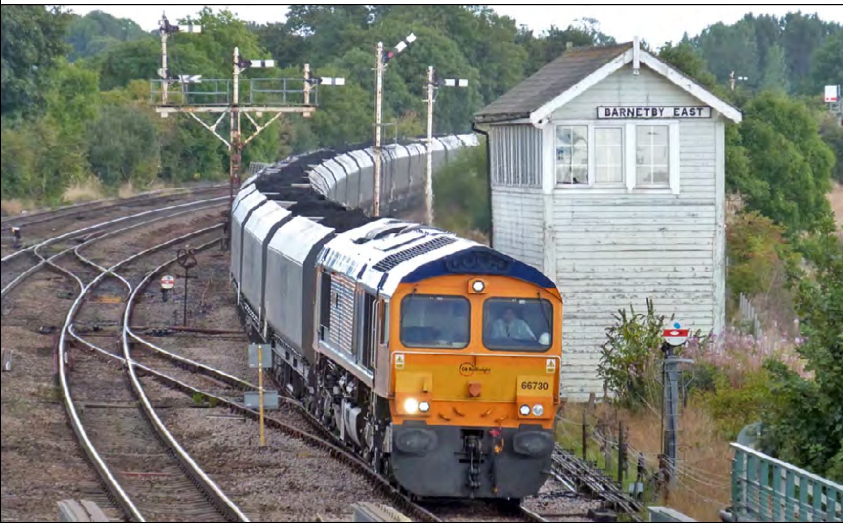
Below: Class 66 730 heads through Barnetby on September 14th with an Immingham - Doncaster Down Decoy loaded coal working. Michael Lynam