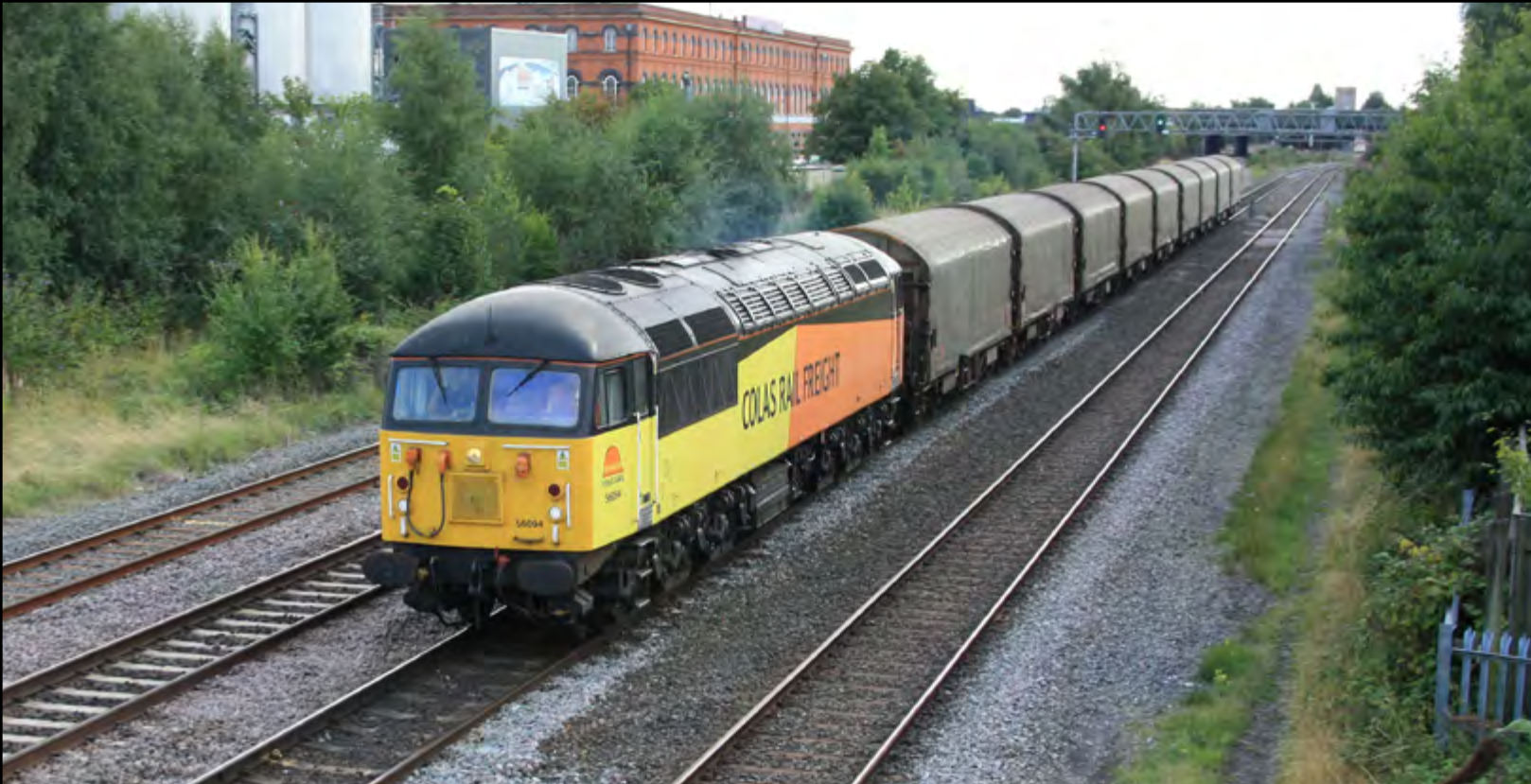
Above: Class 56 094 working the 6E07 Washwood Heath - Boston Docks conveying covered steel carriers, passes Burton on Trent, September 2nd. Stuart Hillis