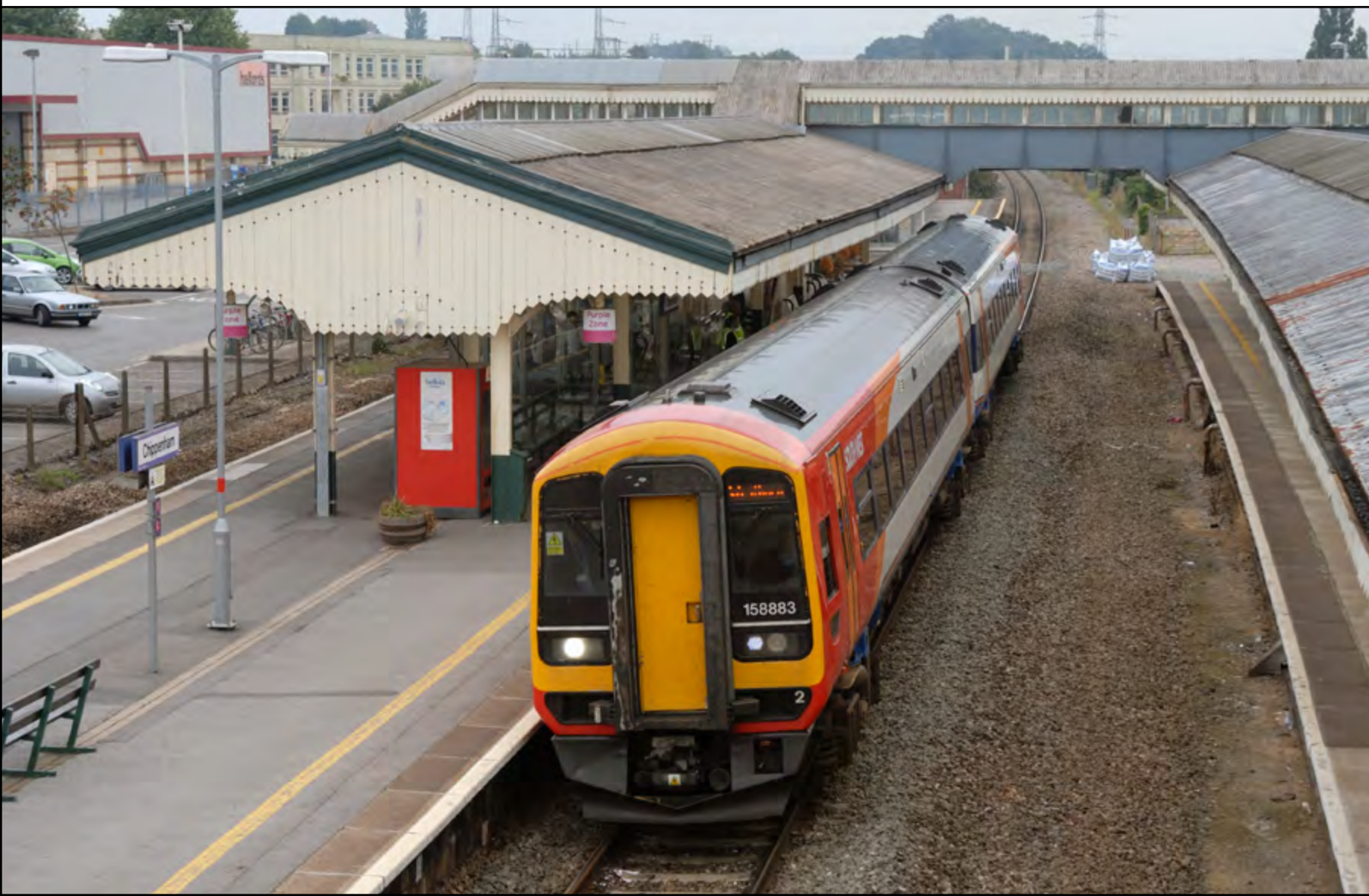
Bottom Left: During August, First Great Western were hiring Class 158 DMUs from South West Trains. This is Class 158 883 on hire at Chippenham, Wiltshire with a 2221 Swindon - Westbury via Melksham service on August 26th.