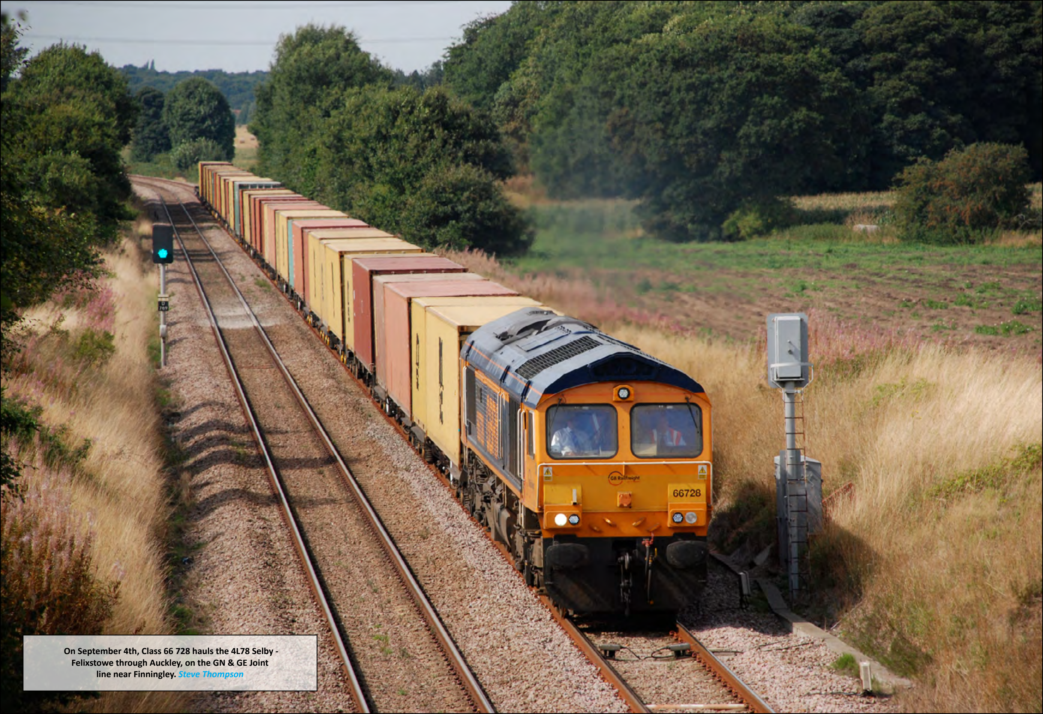
On September 4th, Class 66 728 hauls the 4L78 Selby - Felixstowe through Auckley, on the GN & GE Joint line near Finningley.