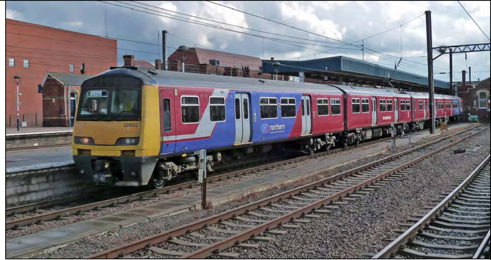
Above: Northern's Class 321 902 is seen at Doncaster on September 9th with a local working to Leeds. These units are getting quite rare at Doncaster now that the Class 322s have arrived.