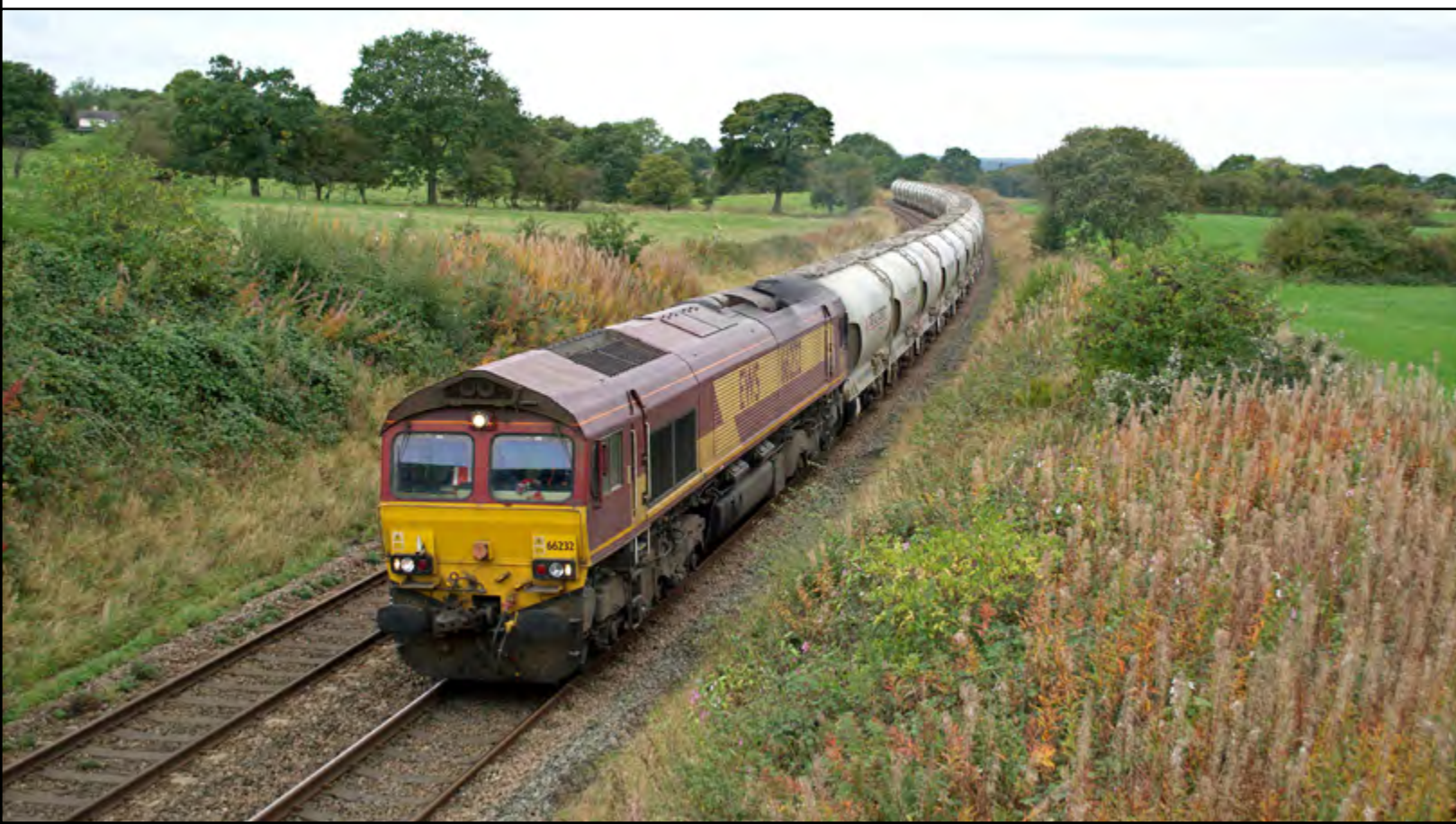
Below: Class 66 232 passes through Hoghton hauling 6Z94 Avonmouth Hanson's Sidings to Clitheroe Castle Cement with empty cement tanks on October 5th.