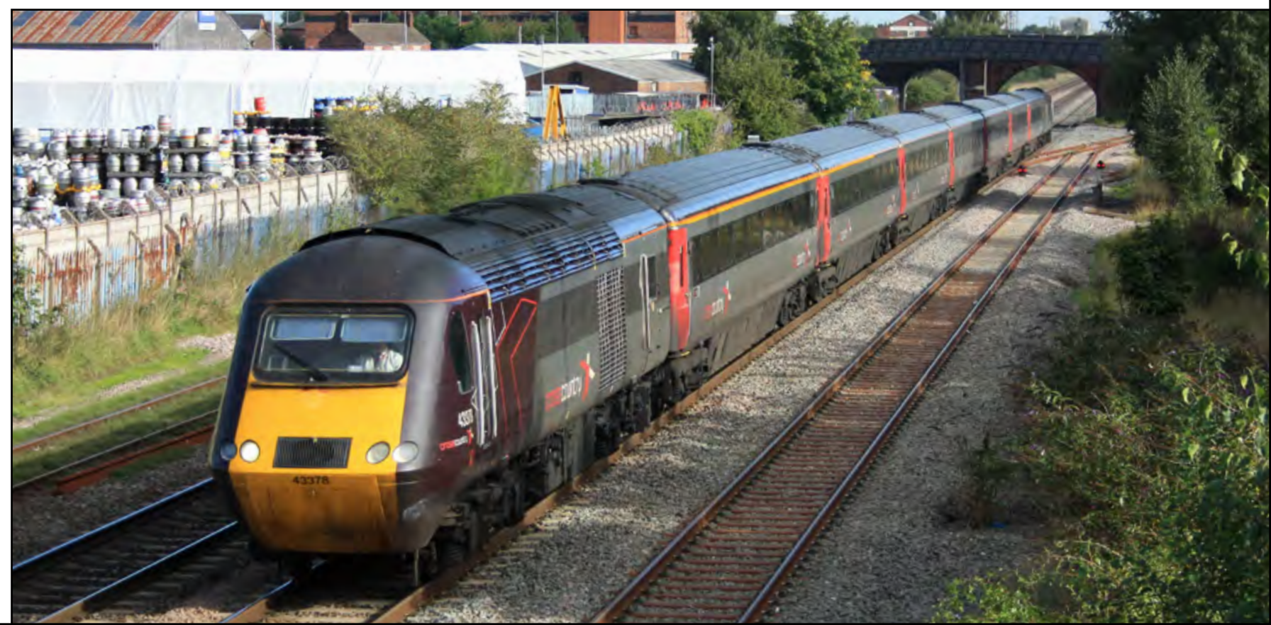
Below: CrossCountry's HST power cars Nos. 43378 and 43321 with the 1V50 Edinburgh - Plymouth service pass through Burton on Trent, September 27th. Stuart Hillis