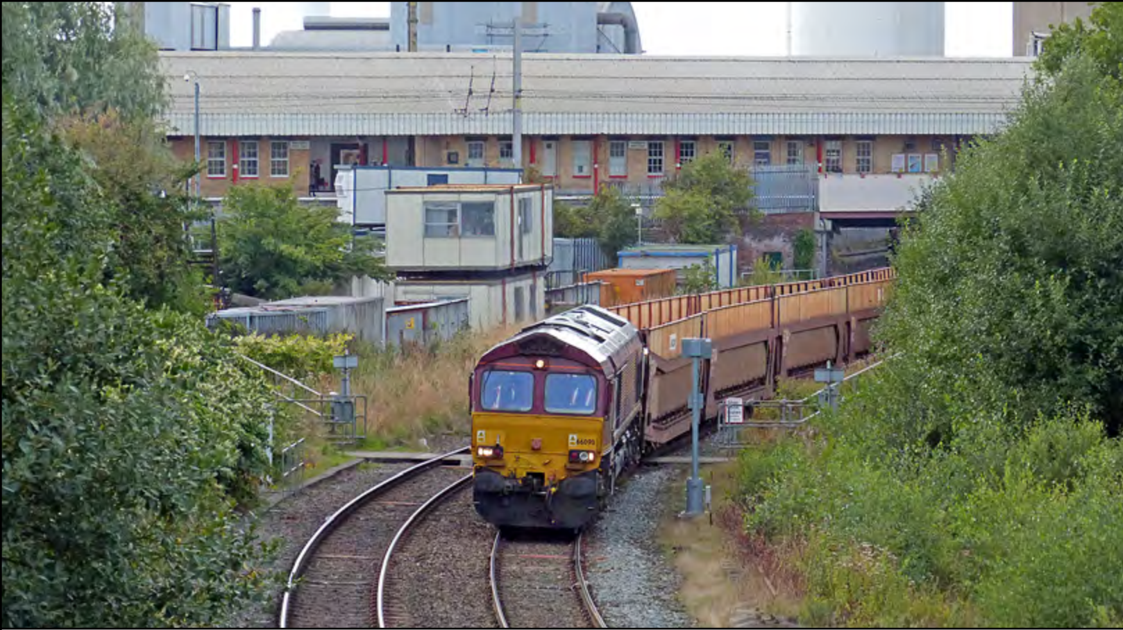
Above: Class 66 090 passes under Warrington Bank Quay with empty car wagons from Garston to Arpley Sidings, September 10th.