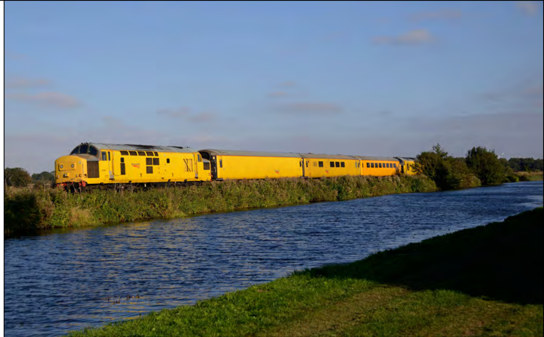
Top Right: Class 97 303 and 97 304 are seen passing Godnow Bridge with a Doncaster - Derby via Scunthorpe and Goole test train on September 28th. Class47