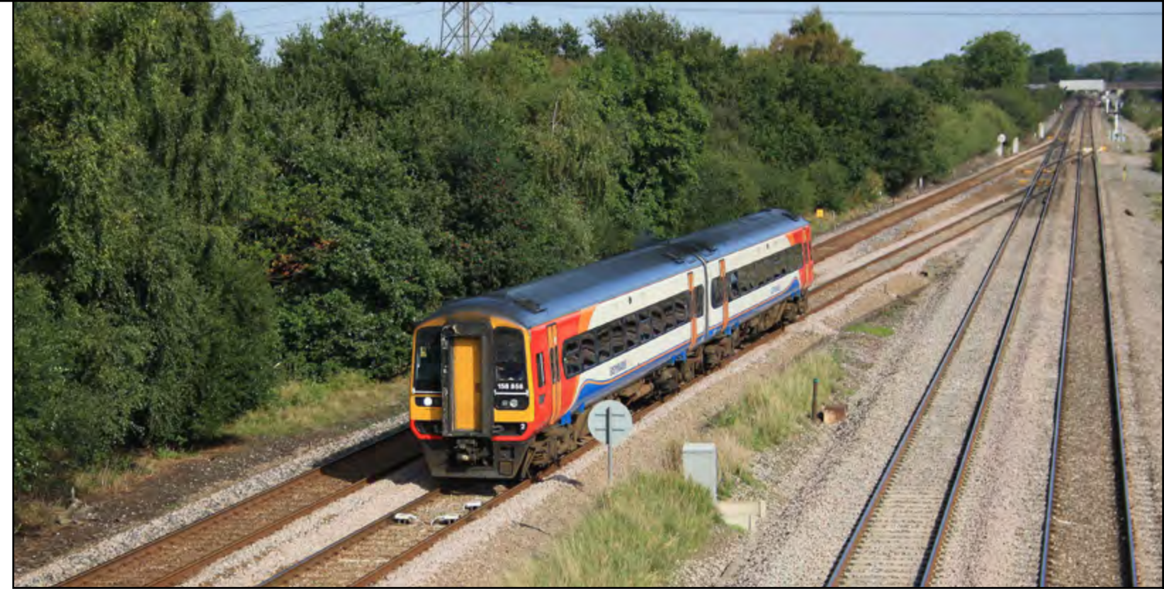
Above: East Midlands Trains' Class 158 858 working the 1K15 Derby - Crewe service passes North Staffs Junction on September 27th. Stuart Hillis