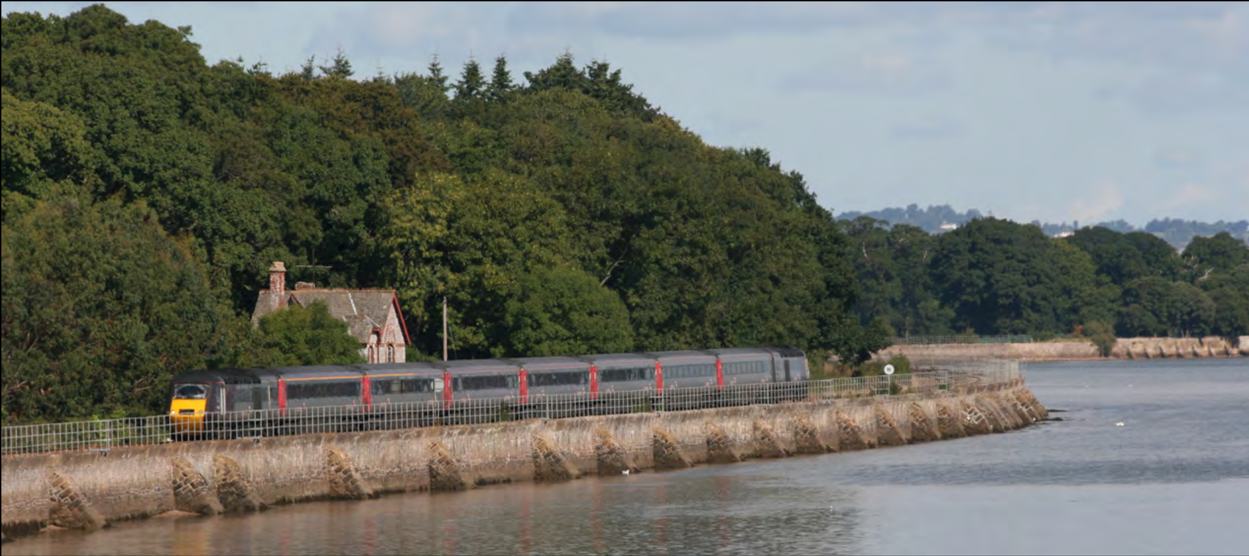
Left: CrossCountry's HST power car No. 43303 heads a Leeds - Plymouth service through Starcross on September 6th. Phil Martin