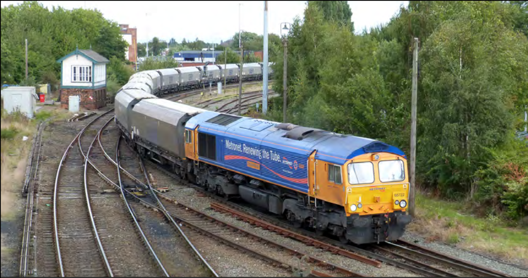
Above: Class 66 722 leaves Arpley Junction on September 10th, heading for Ellesmere Port with empty Biomass hoppers from Ironbridge power station. Michael Lynam