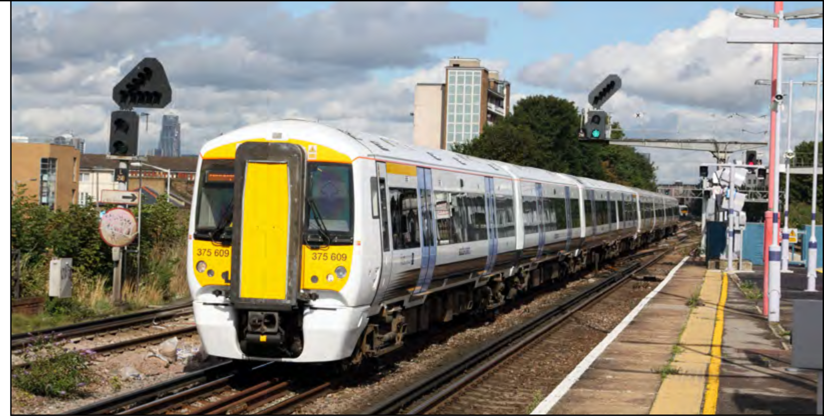
Above: On September 7th, Southeastern's Class 375 609 passes through New Cross. Paul Godding