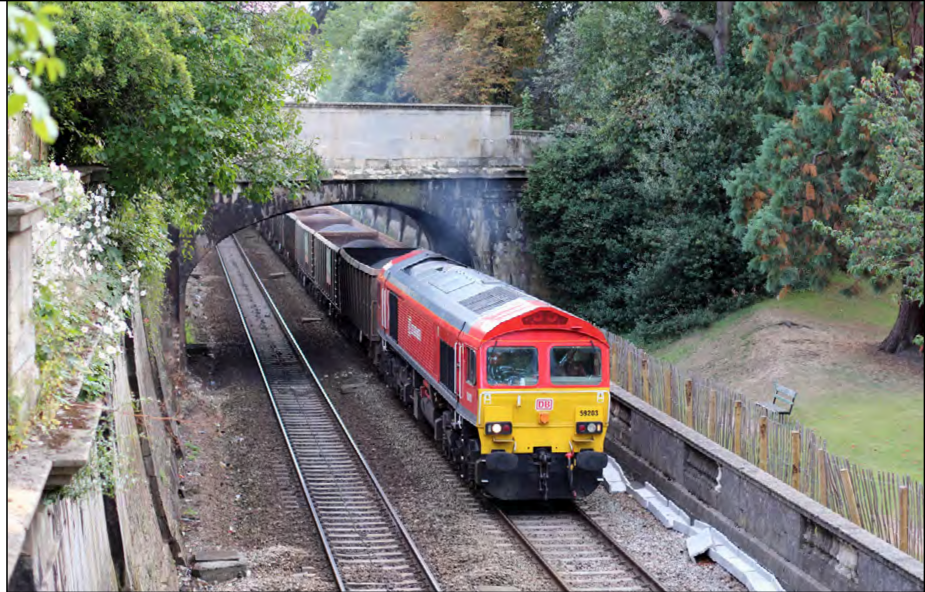
Top Right: Class 59 203 heads a Machen Quarry - Westbury stone train through Sydney Gardens, Bath on September 7th. Chris Morrison