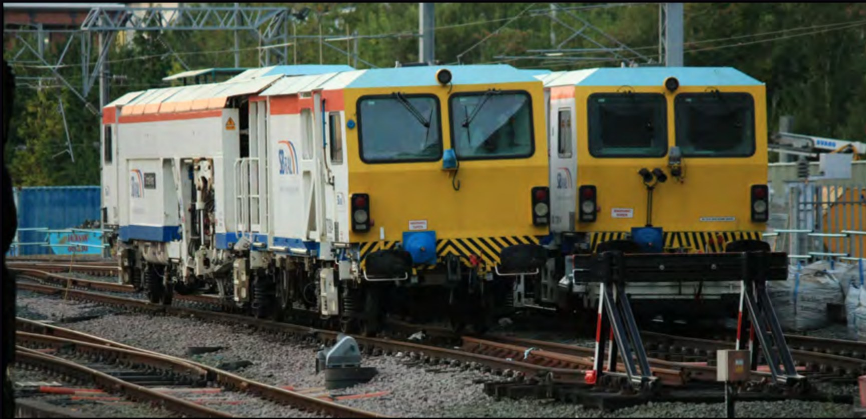
SBRail tampers Nos. DR73904 and DR73914 are seen stabled just north of Preston station. Derek Elston