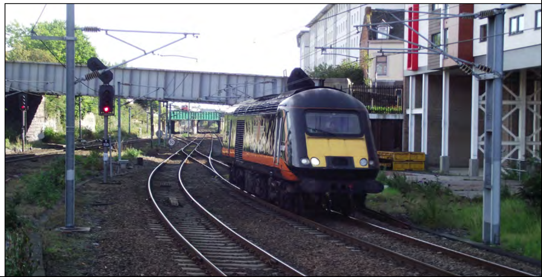
Below: Grand Central's HST power car No. 43480 passes Manors whilst working from Heaton to Crewe LNWR on September 21st. Alex Thorkildsen