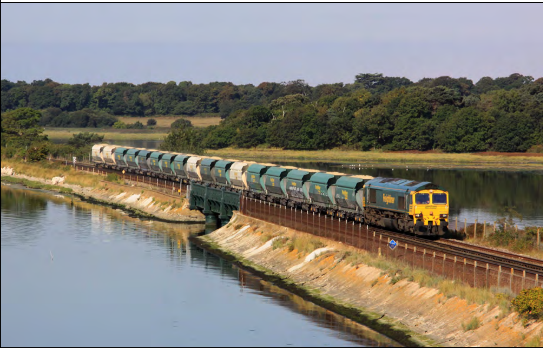
Below: On September 4th, Class 66 547 passes Auckley on the GN & GE Joint near Finningley working the 6R60 Immingham - Drax MGR service.