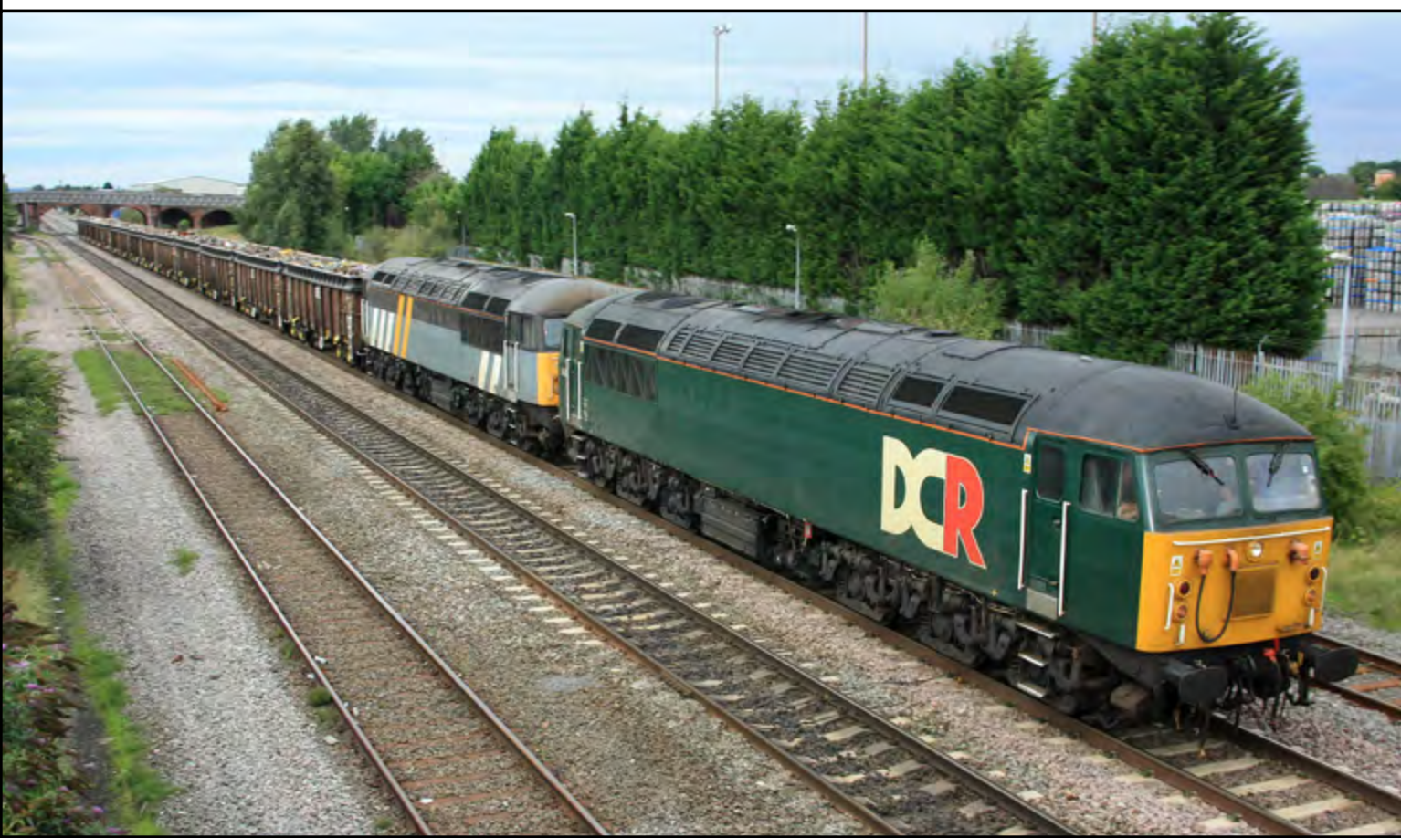
Below: On September 10th, Class 56 303 leads 56 301 through Burton on Trent with the 6Z55 Stockton - Cardiff, which is a new scrap steel flow for DCR. Stuart Hillis