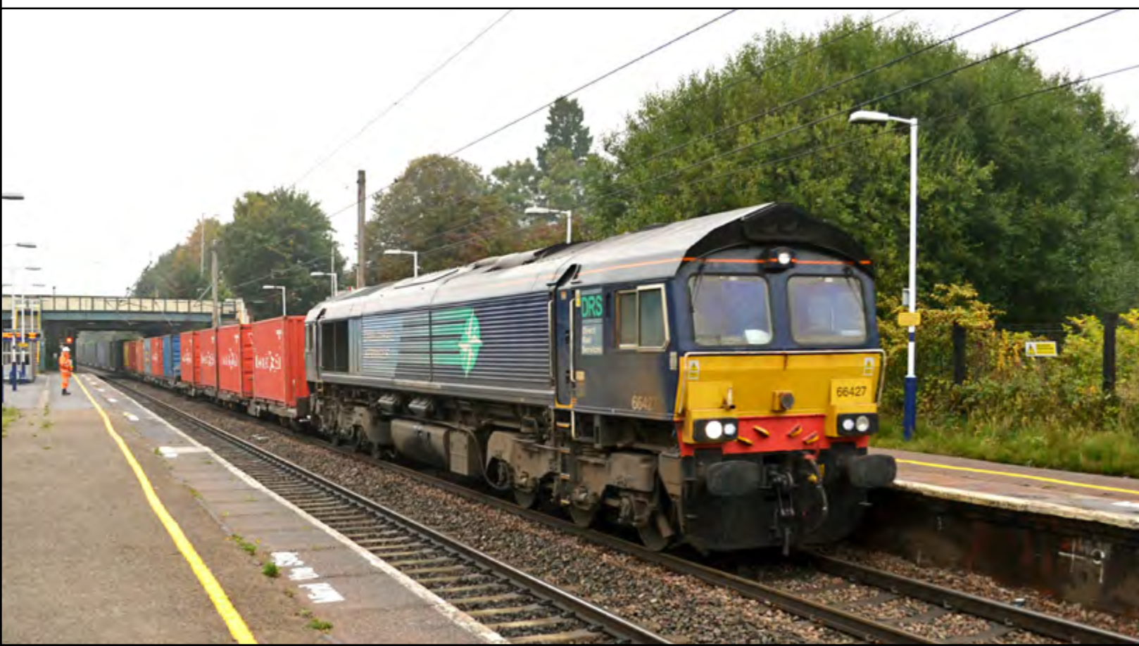
Below: Class 66 427 passes through Leyland station hauling a late running 4M34 04:08 Coatbridge F.L.T. to Daventry DRS (W H Malcolm) on September 25th. Dave Felton