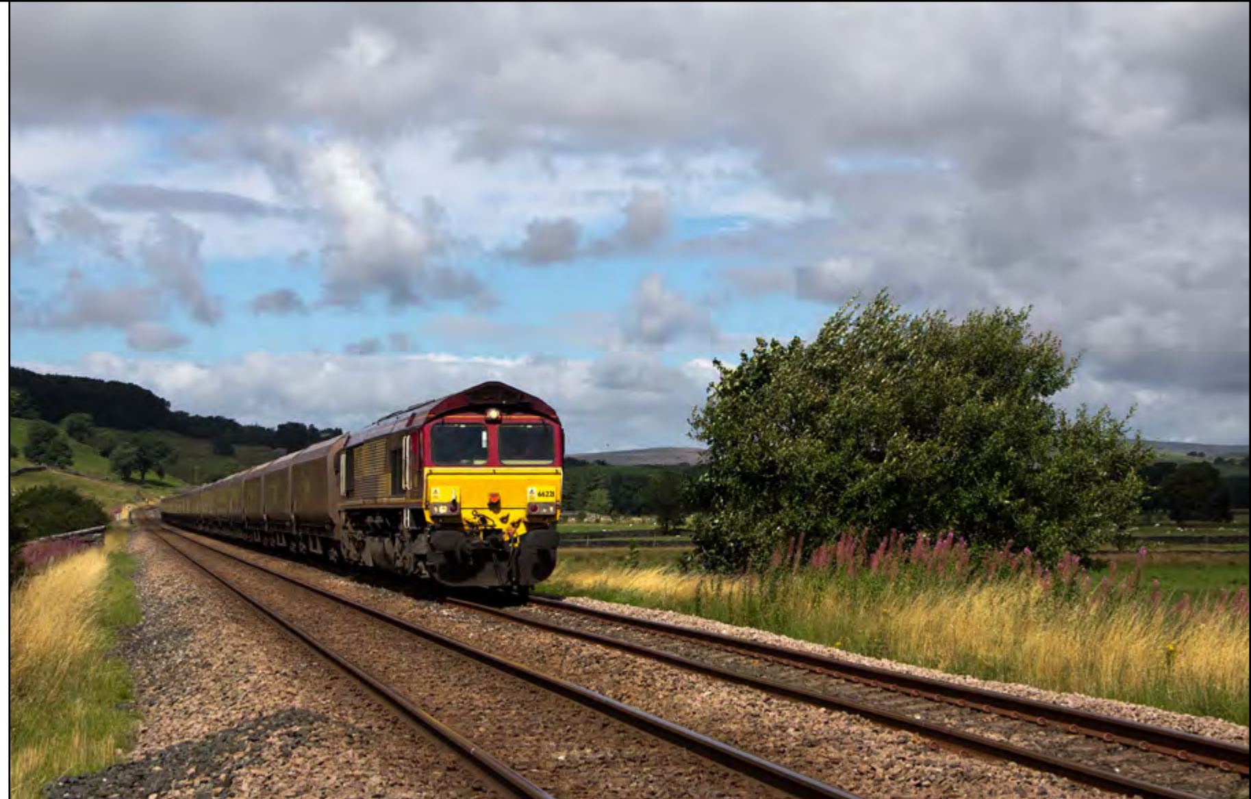
Top Right: After departing two hours late, Class 66 221 makes good time and arrives at Helwith Bridge farm crossing only 48 mins down with the 6J76 03:55 Hunterston H.L. to Ferrybridge power station MGR working on August 31st.