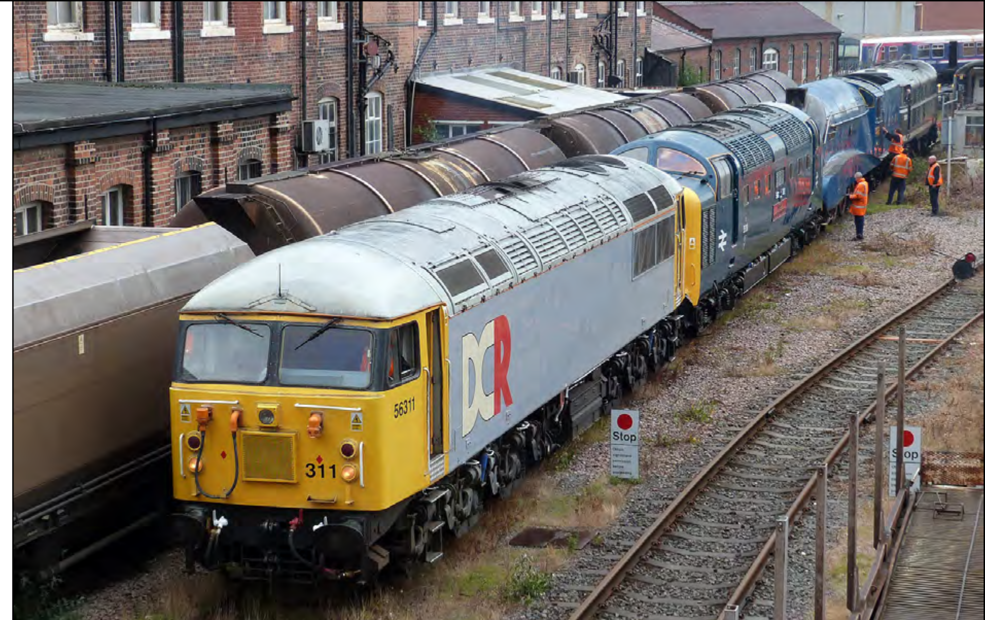
Top Right: Class 56 311 is seen arriving at Doncaster Wabtec Rail works on September 9th with the 5276 from Grantham conveying Class 55 019 'Royal Highlander Fusilier', A4 No. 4468 'Mallard', and with Class 31 190 (D5613) on the rear. The locos were for a VIP Viewing and Gala Dinner to be held for 100 lucky guests at Wabtec, as part of this years St. Leger Festival Week.