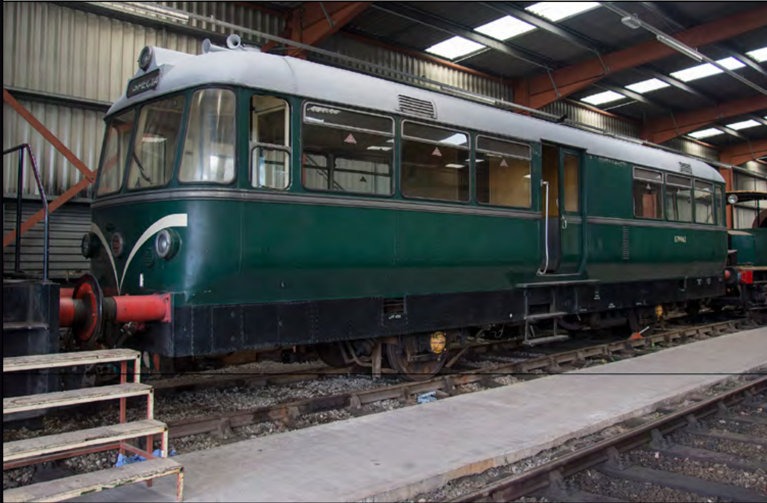
Waggon und Maschinenbau railbus No. E79960 is seen at the Ribble Steam Railway on September 14th. Brian Battersby