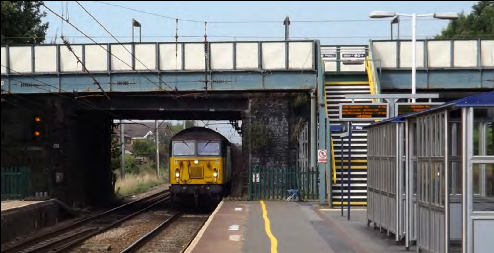
Above: Class 56 302 passes under the road bridge and footbridge at Leyland station with the 6J37 loaded log train heading for Chirk on September 4th. Eddie Emmott