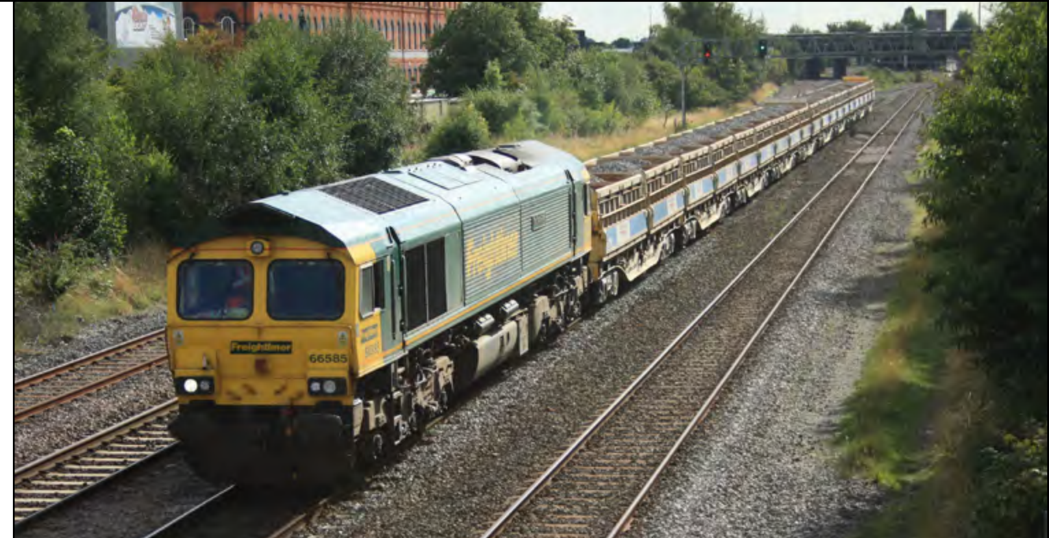
Above: Class 66 585 'The Drax Flyer' working the 6Z96 Crewe - Toton engineers passes through Burton on Trent, September 2nd. Stuart Hillis