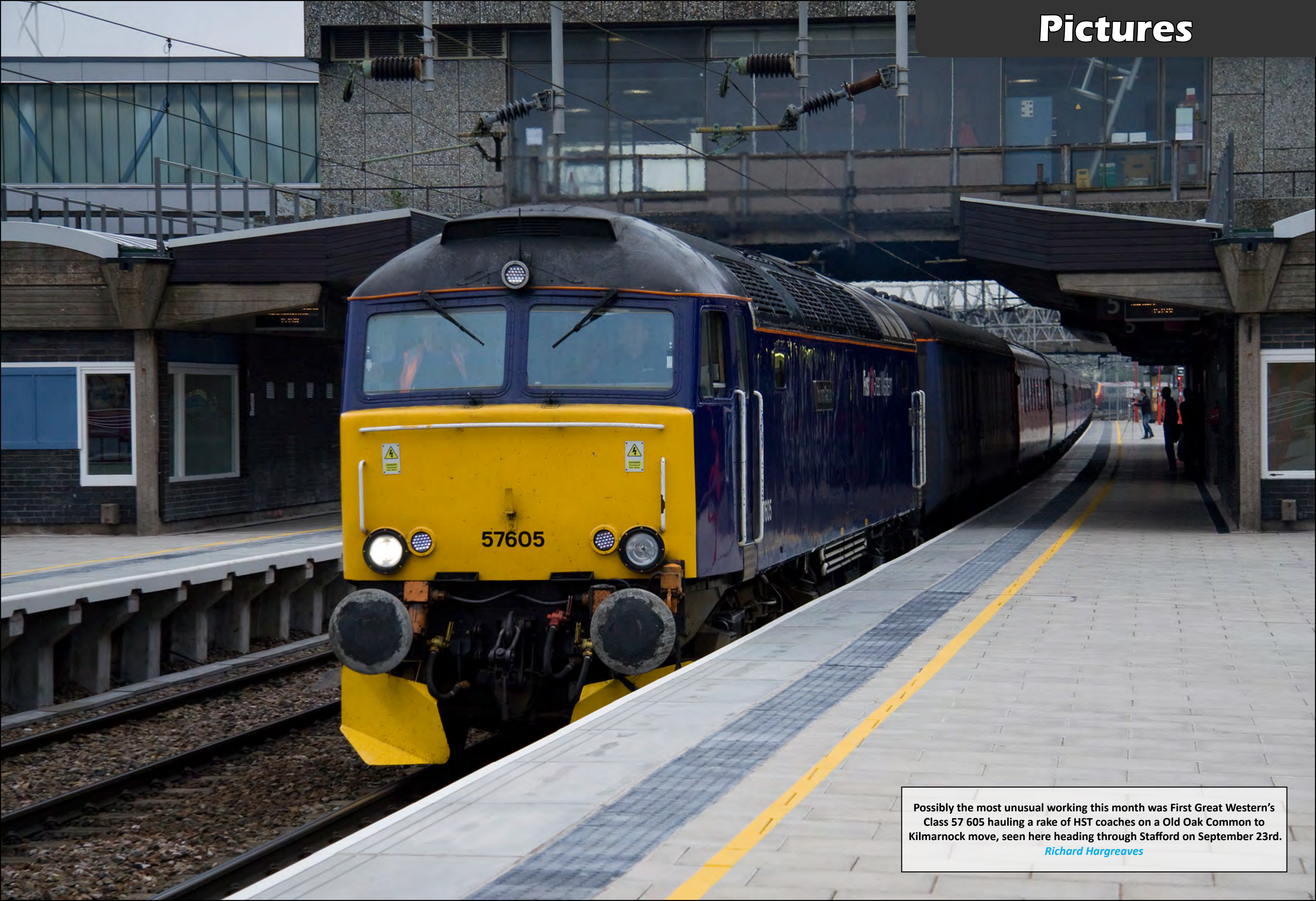
Possibly the most unusual working this month was First Great Western's Class 57 605 hauling a rake of HST coaches on a Old Oak Common to Kilmarnock move, seen here heading through Stafford on September 23rd. Richard Hargreaves