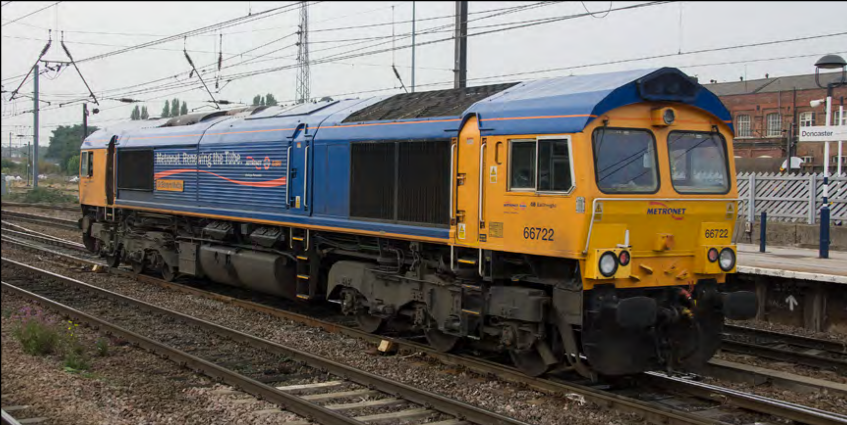
Above: Class 66 722 heads light engine through Doncaster on September 28th. Brian Battersby