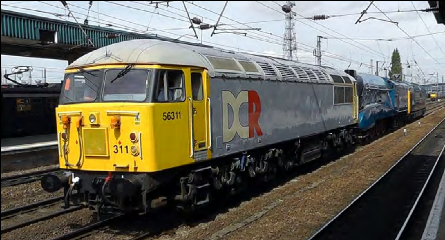
Above: On September 4th, Class 56 311 passes through Doncaster hauling LNER A4 No. 4468 'Mallard' and Class 55 019 'Royal Highland Fusilier' with a York NRM to Grantham move.