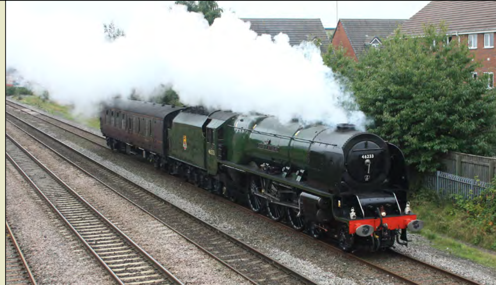
ECS and light engine moves

Below: It's the end of the Scarborough Spa Expresses for another year and West Coast's Class 47 760 pilots Stanier 2-8-0 No. 48151 and 4-6-0 No. 46115 'Scots Guardsman' near Eldroth with the coaching stock back to Carnforth, August 30th.