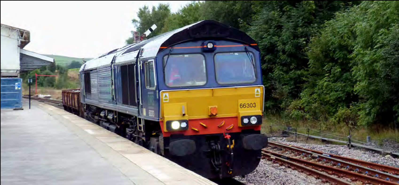
Above: Class 66 303 heads through Hellifield on September 13th with an extremely light working from Carlisle to Crewe.