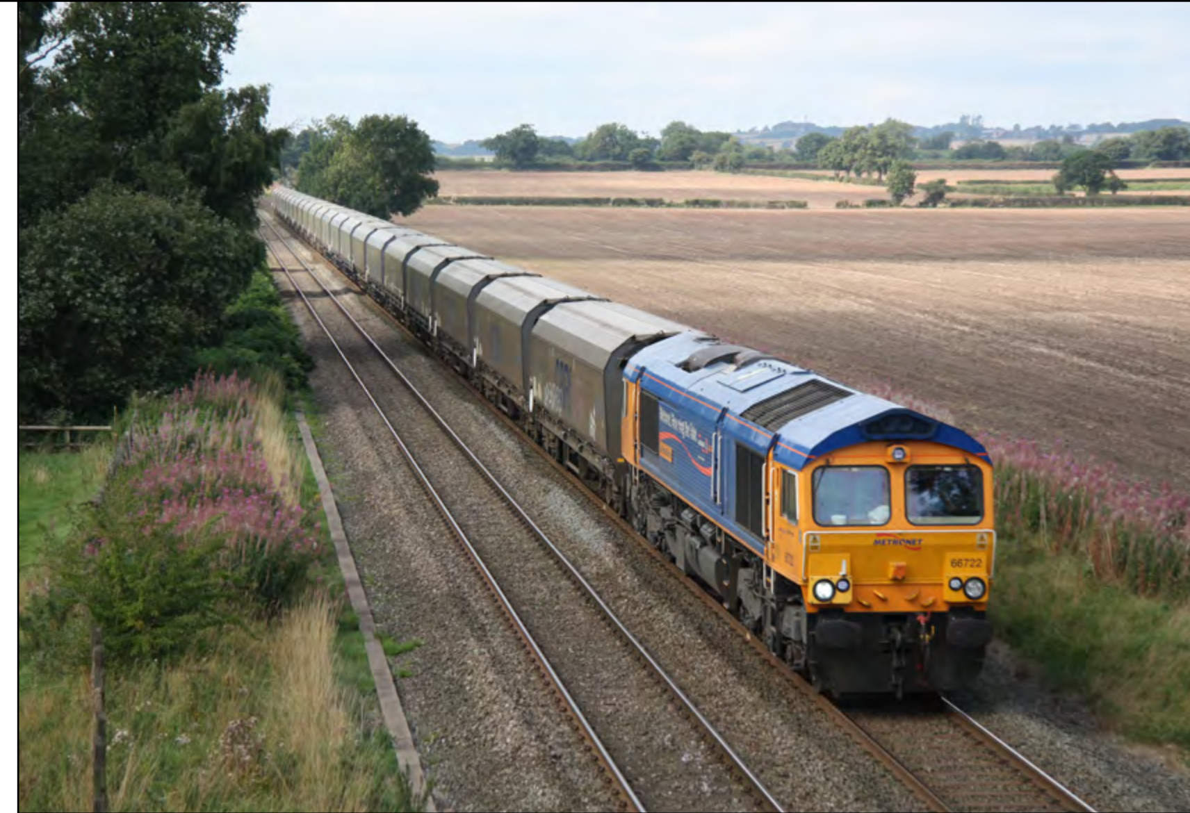
Top Right: On August 30th, Class 66 722 is seen at Ruckley with an empty Biomass working from Ironbridge.