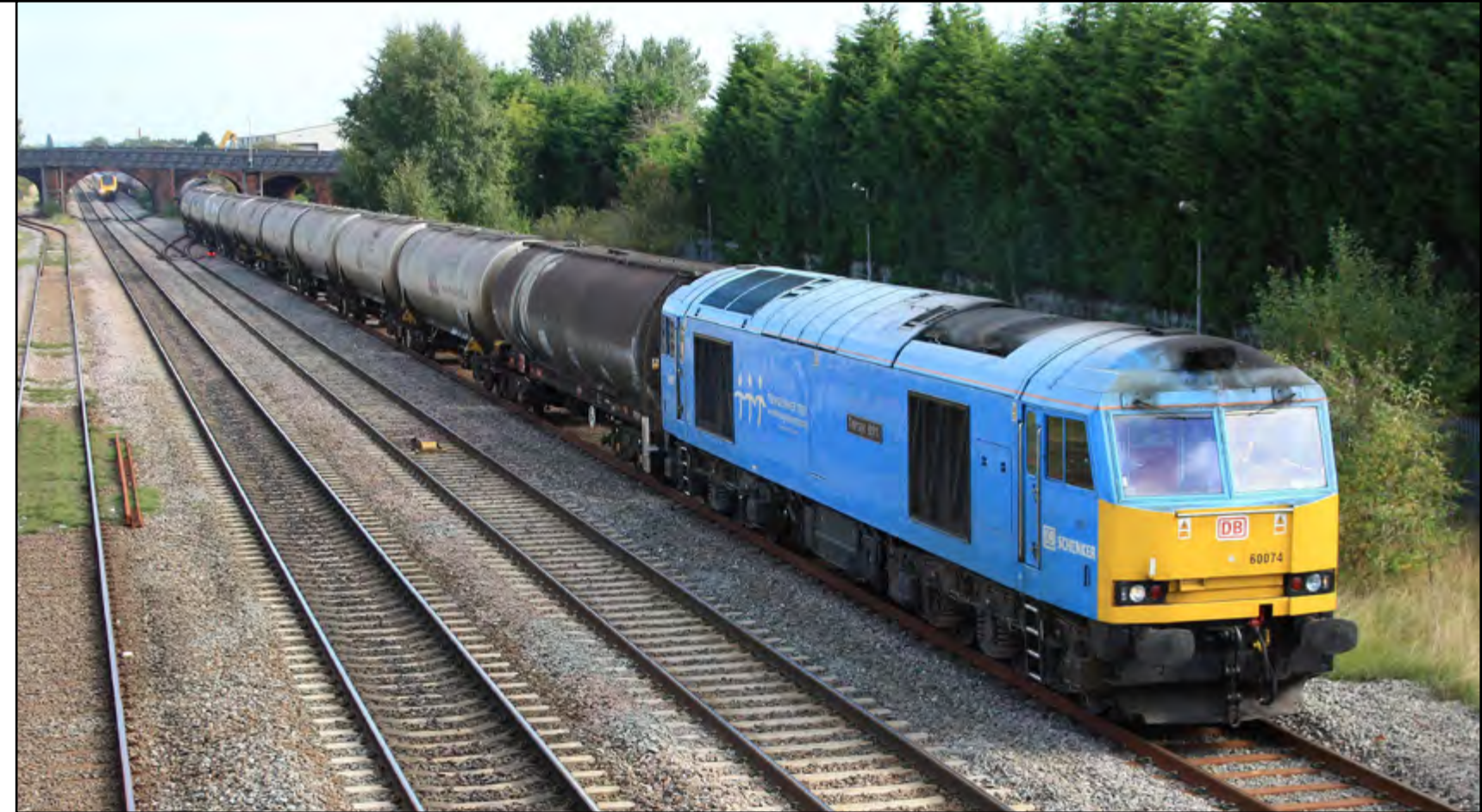
Above: About to be overtaken by a CrossCountry service, Class 60 074 'Teenage Spirit' works 6M57 Lindsey - Kingsbury loaded oil tanks heads through Burton on Trent on the goods line, September 27th. Stuart Hillis