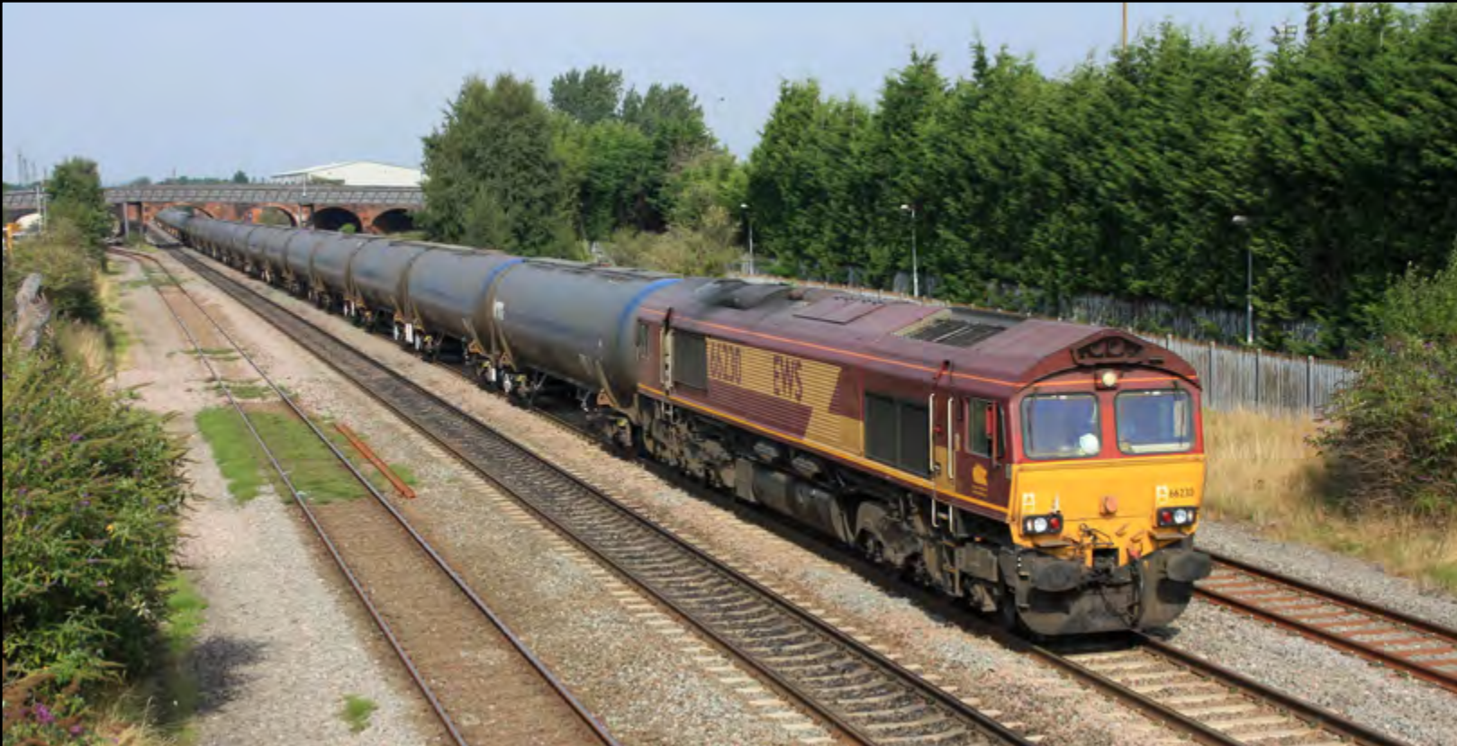
Above: Class 66 230 is seen working the 6M00 Humber - Kingsbury loaded oil tanks through Burton on Trent, September 5th. Stuart Hillis