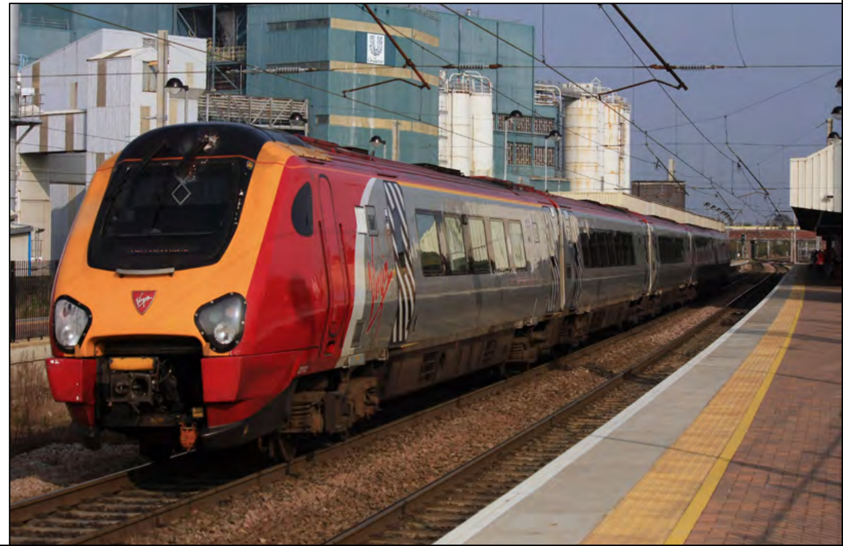
Below: Virgin Trains' Class 221 112 with modified nose skirt and repositioned numbers arrives at Warrington Bank Quay on September 28th with an Edinburgh service.