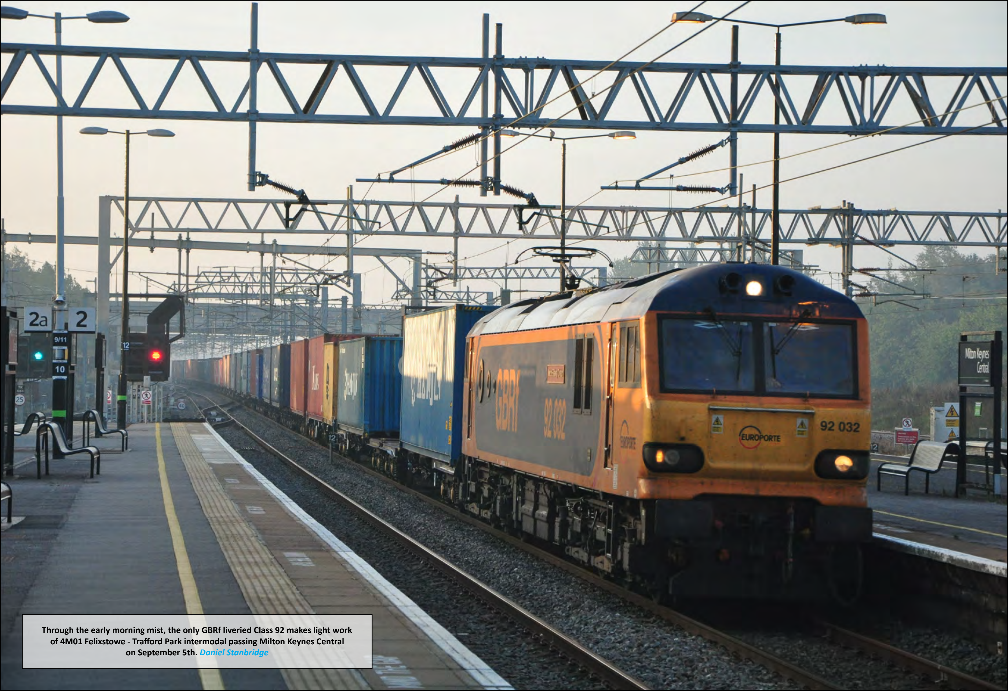
Through the early morning mist, the only GBRf liveried Class 92 makes light work of 4M01 Felixstowe - Trafford Park intermodal passing Milton Keynes Central on September 5th.