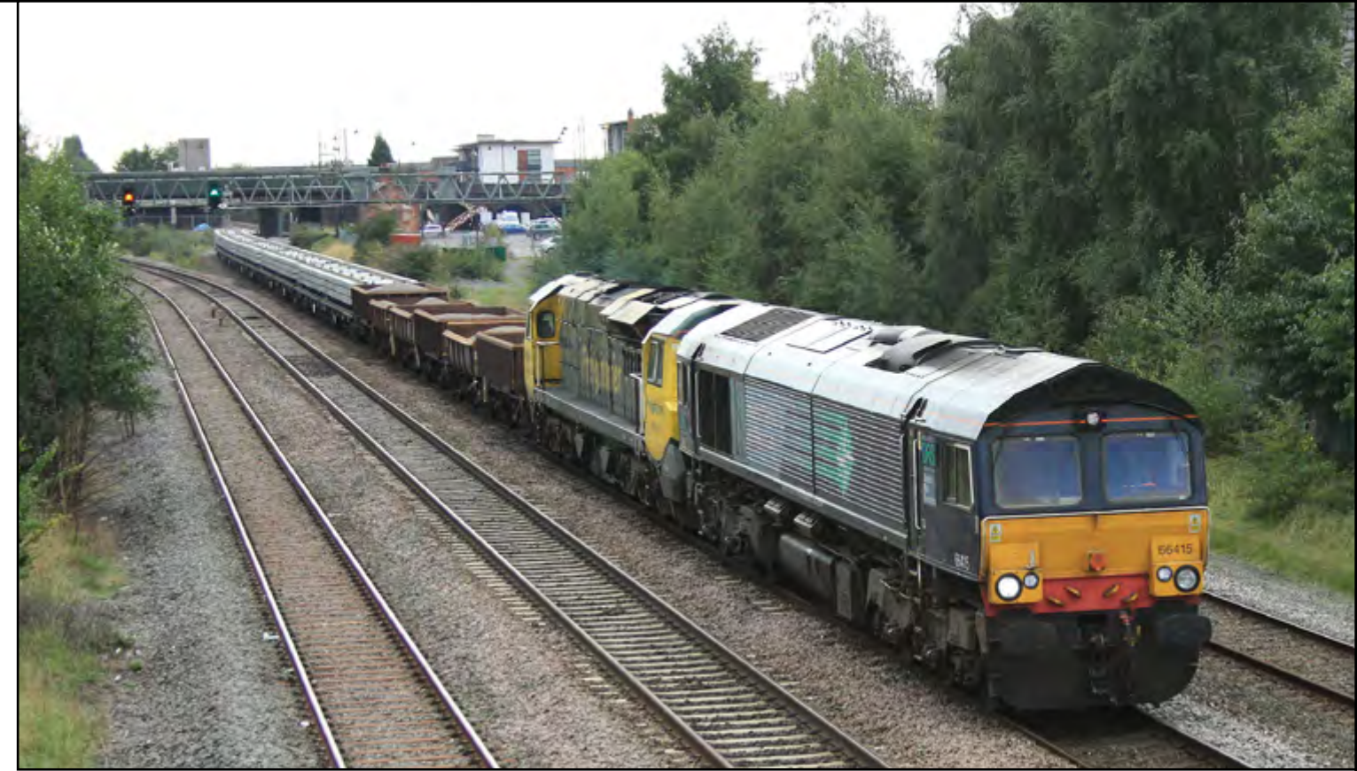
Above: Class 66 415 and 70 011 are seen at the head of the 6296 Crewe - Toton engineers as it passes through Burton on Trent, September 10th. Stuart Hillis