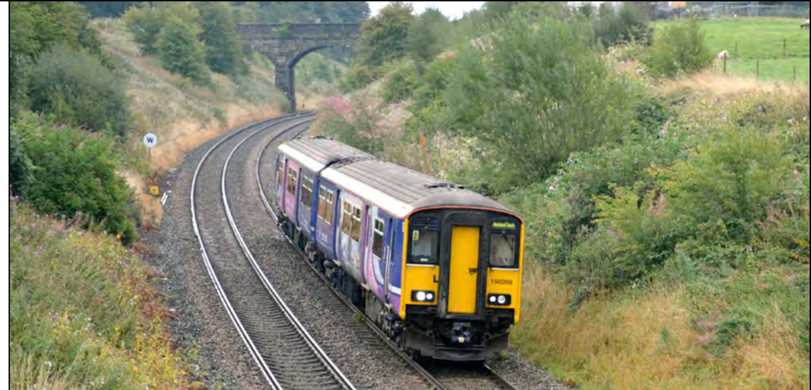
Above: Northern Rail's Class 150 269 passes through Hoghton Bottoms with the 2S15 07:50 service from Colne to Blackpool South on September 7th.

Top Left: Before the masses could afford to buy and run motor cars and before holidays abroad became the norm for many, seaside resorts in Britain prospered often with the help of the railways. Barry Island was one such resort and was the destination for many excursion trains from both the valleys of South Wales and from inland towns of England especially during the 1950s and 1960s. However, Barry Island now rarely receives any excursions, but during the summer has a very regular service to Cardiff and the valleys, this image shows Arriva Trains Wales Class 150 264 about to depart with the 16:25 to Merthyr Tydfil on an overcast August 30th. Behind and to the left may be seen the infrastructure of part of the former station, now in the care of the Barry Tourist Railway, a private operator that runs heritage trains several weekends each year between Barry and the Island, the track running parallel to the Network Rail lines.