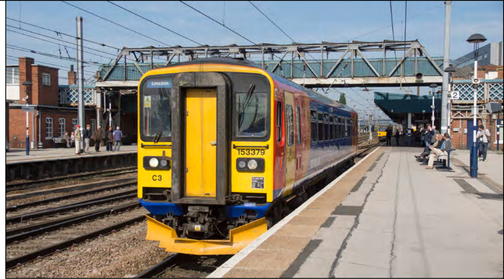
Above: East Midlands Trains' Class 153 379 heads out of Doncaster on September 28th with a service to Lincoln. Brian Battersby