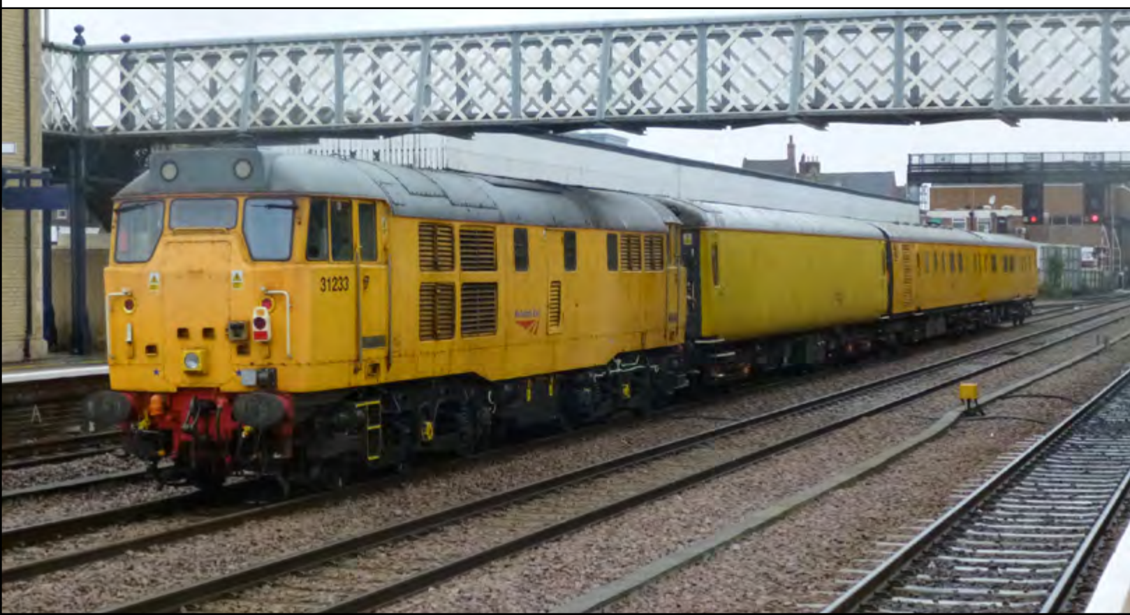
Below: On September 19th, a cold, dull, wet Lincoln welcomed Class 31 233 and its train full of technical gubbins, working as 3Q98 Peterborough - Derby RTC. Steve Thompson