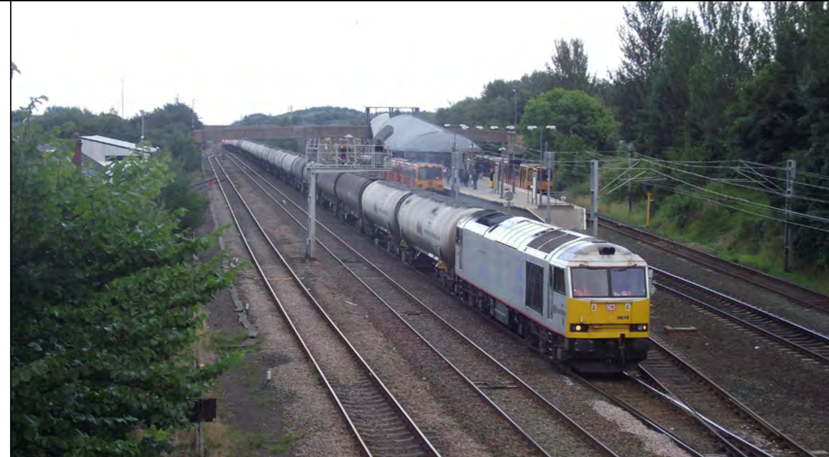
Above: Class 60 099 heads a rake of empty bogie tanks past Pelaw on September 9th. Alex Thorkildsen