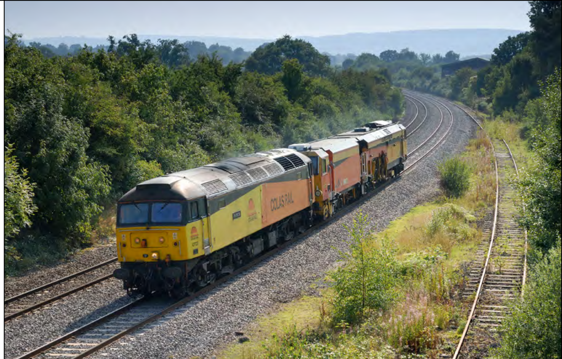
Below: On September 25th, Class 56 087 leaves Ribbleshead for Blea Moor to run round its train before returning on route for Chirk via Hellifield & Blackburn to the WCML. Michael Lynam