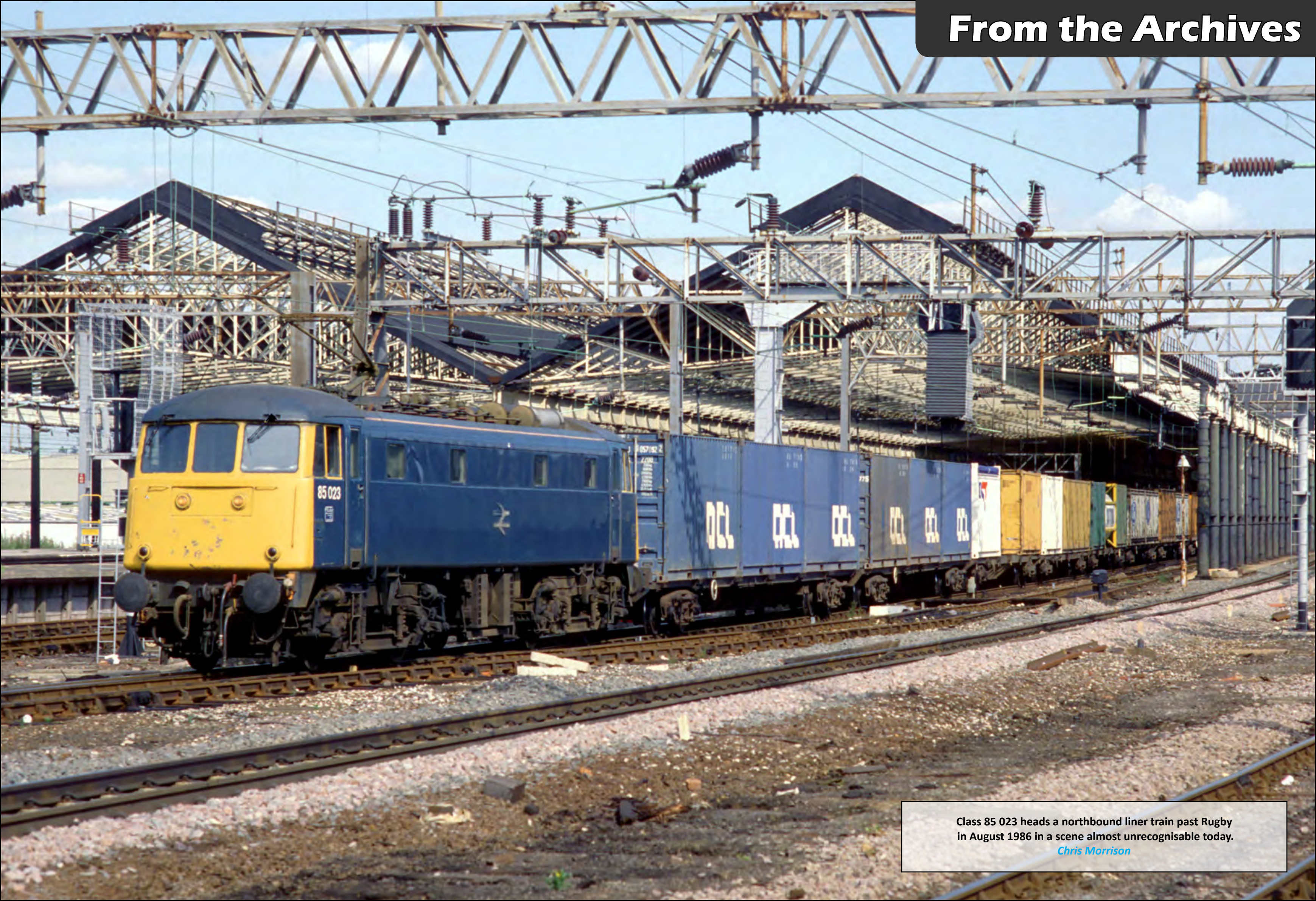
Class 85 023 heads a northbound liner train past Rugby in August 1986 in a scene almost unrecognisable today.