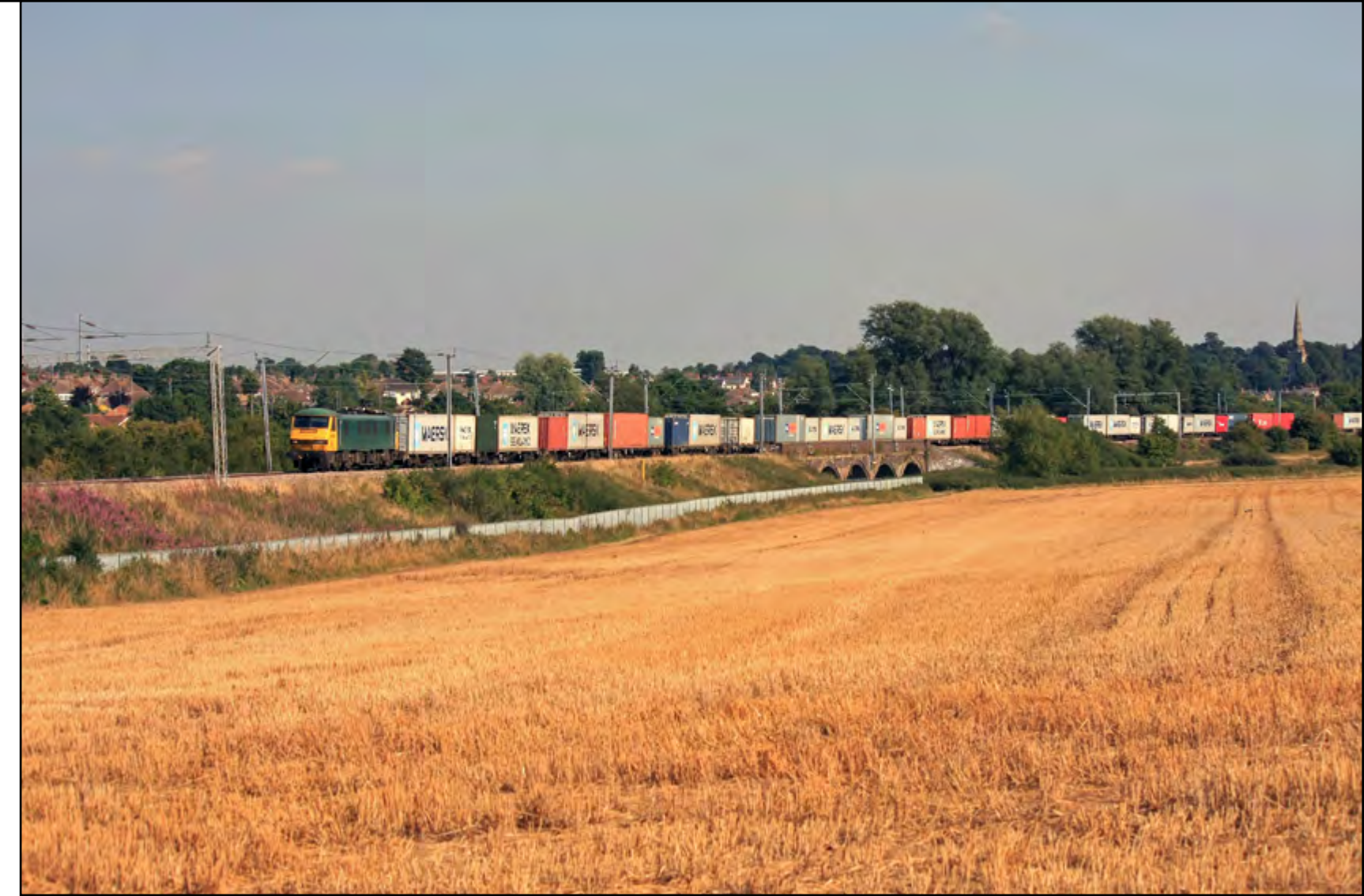
Top Right: On September 4th, Class 90 046 leads the 4M87 Felixtowe to Trafford Park past Kingsthorpe. Derek Elston

Bottom Right: The semaphore signalling on the branch line across Cannock Chase in Staffordshire was removed over the August bank holiday in 2013, replaced by colour-light signals controlled from the West Midlands Regional Operations Centre at Saltley and resulting in the closure of the Bloxwich, Hednesford No. 1 and Brereton Sidings signal boxes. The final day that the boxes controlled trains was on August 22nd when Class 66 536 climbed through Rugeley with the 4E73 Rugeley power station - Barrow Hill up sidings empty hopper train, passing the Brereton Sidings signal box for one last time. Gary S. Smith