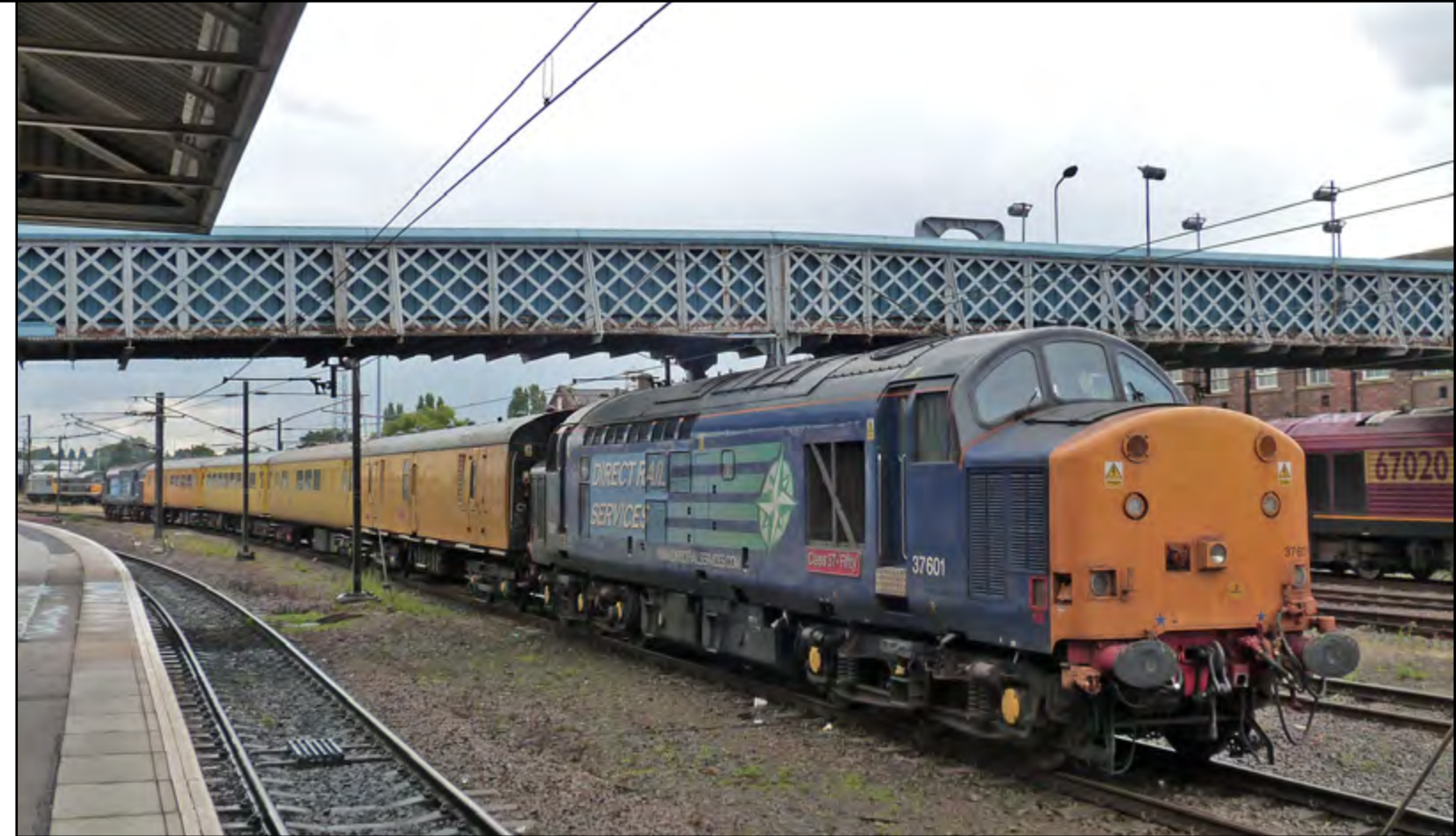
Above: Class 37 601 and 37 605 top'n'tail a Derby RTC - Newark test train through Doncaster on September 9th. Michael Lynam