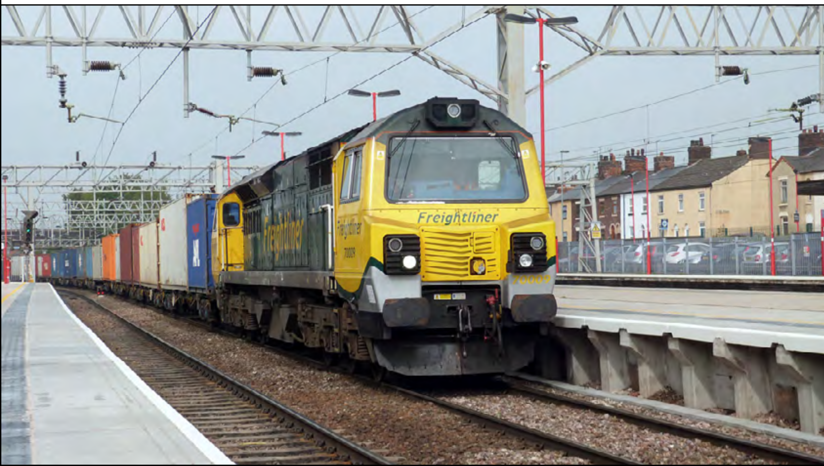
Below: Class 70 009 heads a Trafford Park FLT - Southampton MCT through Stafford on September 24th. Michael Lynam