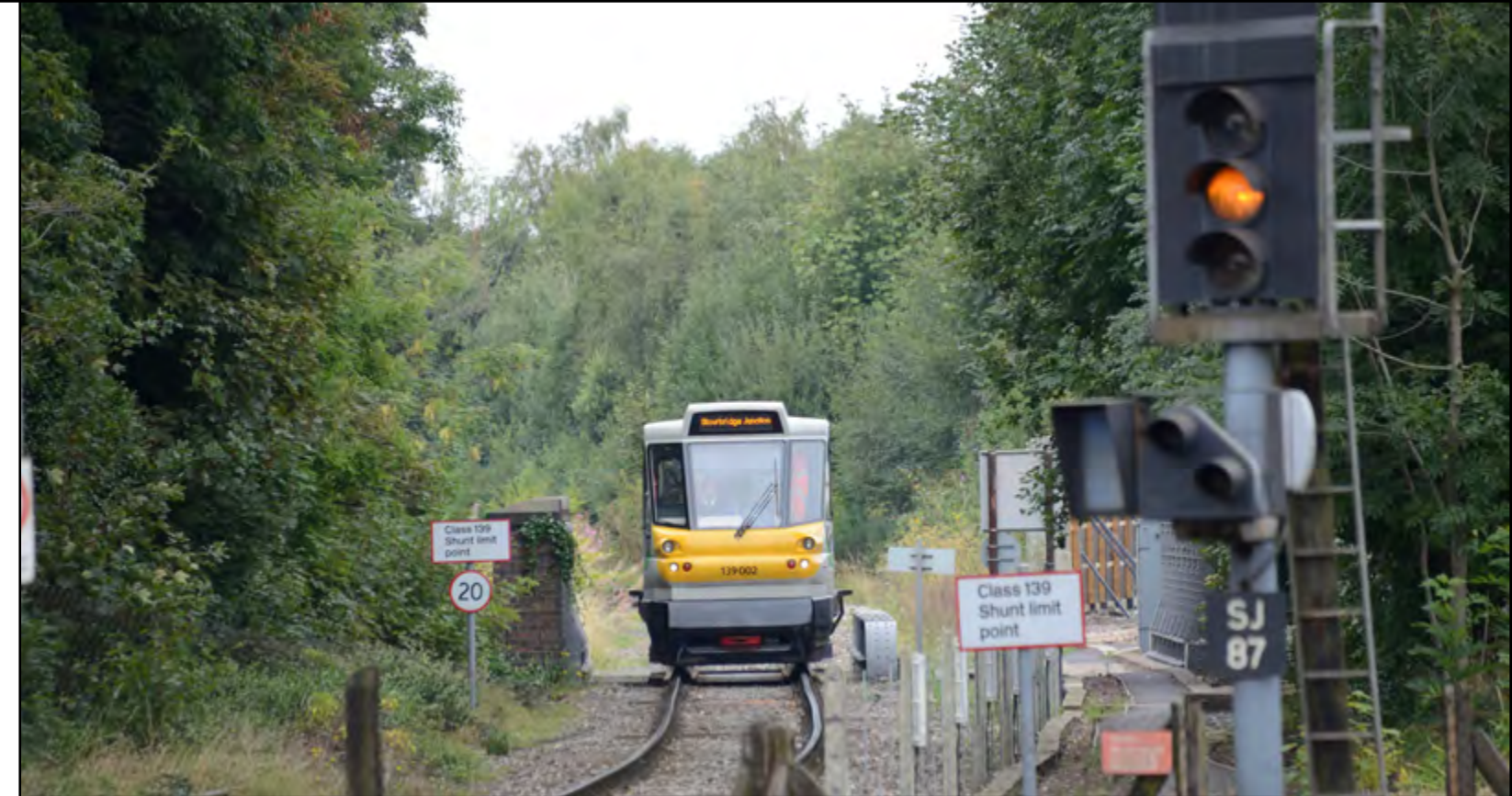
Above: On September 28th, Class 139 002 is seen arriving into Stourbridge Jct. with the shuttle from Stourbridge Town. Class47